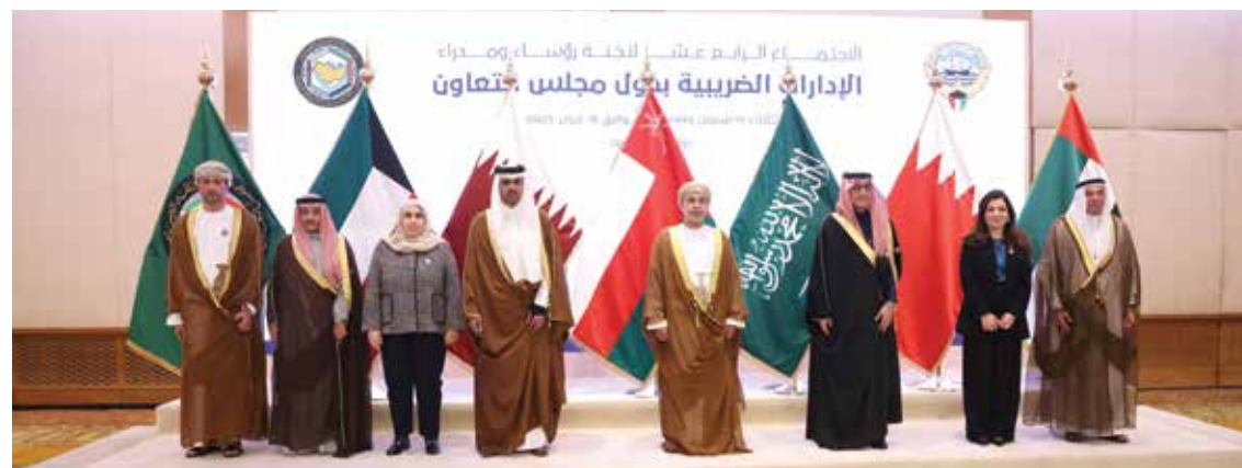
GCC Heads and Directors of Tax Departments gather for a group photo during the 14th meeting of the committee in Kuwait.