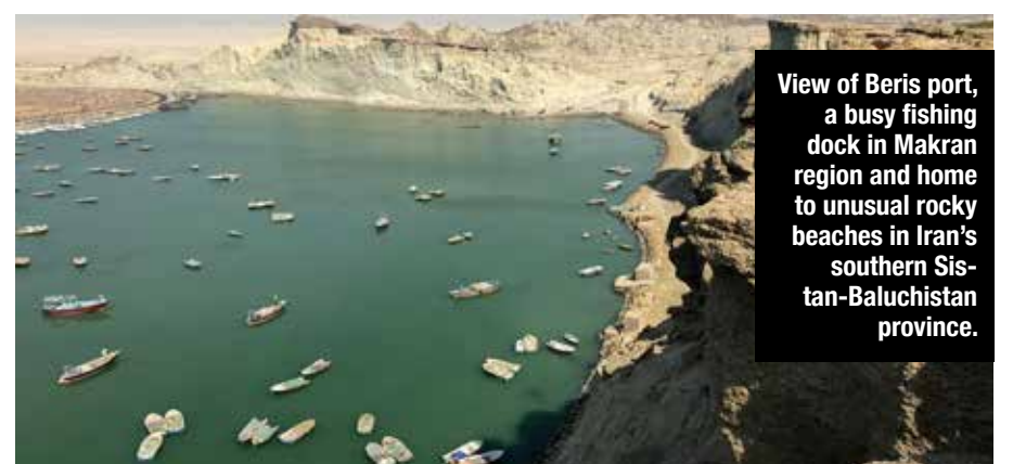
View of Beris port, a busy fishing dock in Makran region and home to unusual rocky beaches in Iran's southern Sistan-Baluchistan province.