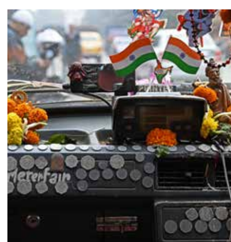
Dashboard of a Hindustan Ambassador yellow taxi decorated with old Indian coins in Kolkata.