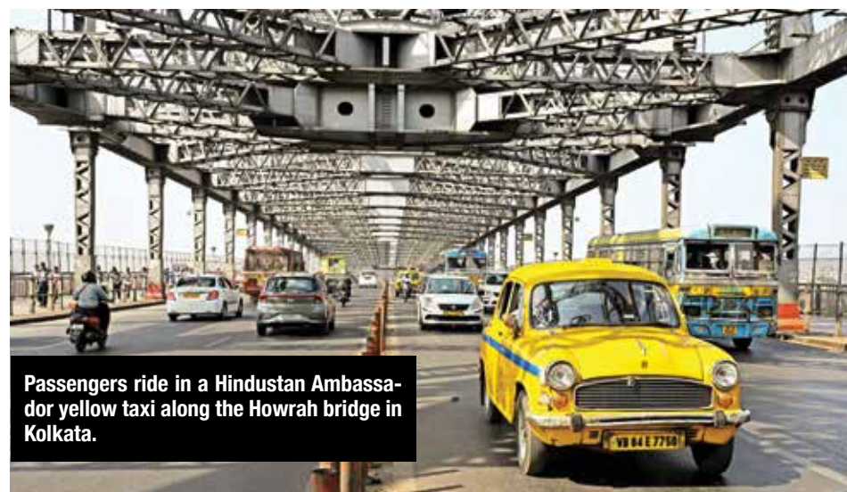
Passengers ride in a Hindustan Ambassador yellow taxi along the Howrah bridge in Kolkata.