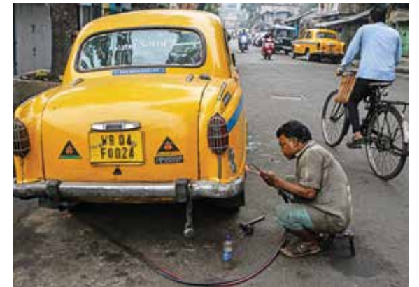
A motor mechanic repairs a Hindustan Ambassador yellow taxi along a roadside in Kolkata.

K olkata locals cherish their city's past, which is why many in the one-time Indian capital are mourning a vanishing emblem of its faded grandeur: a hulking and noisy fleet of stately yellow taxis. The snub-nosed Hindustan Ambassador, first rolling off the assembly line in the 1950s with a design that barely changed in the decades since, once ruled India's potholed streets. Nowadays it is rarely spotted outside Kolkata, where it serves as the backbone of the metropolitan cab fleet and a readily recognizable symbol of the eastern city's identity. But numbers are dwindling fast, and a court ruling means those that remain - lumbering but still sturdy - will be forced off the roads entirely in the next three years.