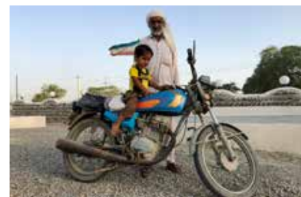
A Baluch man watches over a child playing on a motorcycle with an Iranian flag visible in the background in Iran's southern Sistan-Baluchistan province.