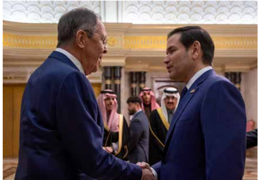
RIYADH: US Secretary of State Marco Rubio shakes hands with Russian Foreign Minister Sergei Lavrov during their meeting at Diriyah Palace on Feb 18, 2025.