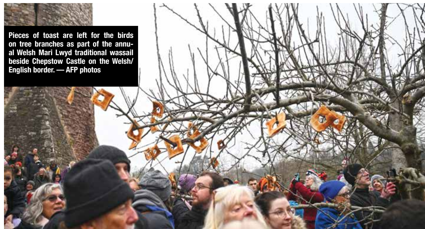
Pieces of toast are left for the birds on tree branches as part of the annual Welsh Mari Lwyd traditional wassail beside Chepstow Castle on the Welsh/English border.