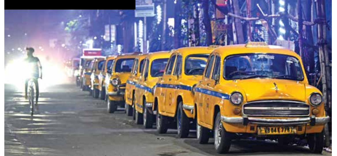
Hindustan Ambassador yellow taxis parked along a roadside in Kolkata.

Another 1,000 will be retired this year, and West Bengal state transport minis-