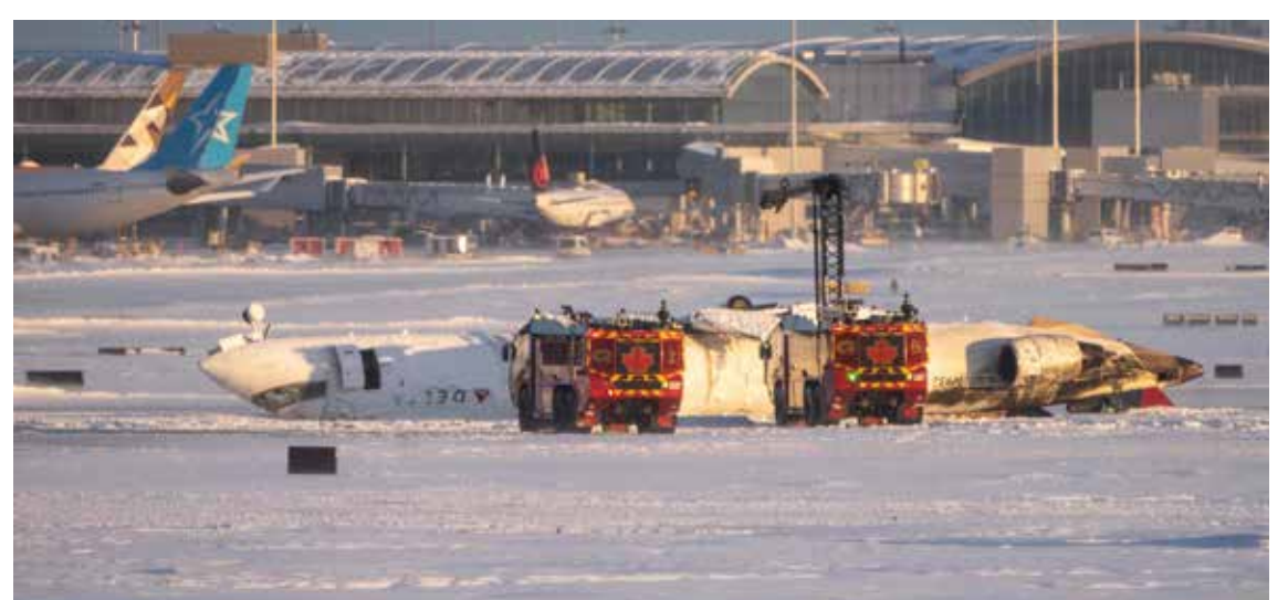
TORONTO: Emergency personnel work at the scene of a Delta Airlines plane crash at Toronto Pearson International Airport on Feb 17, 2025.