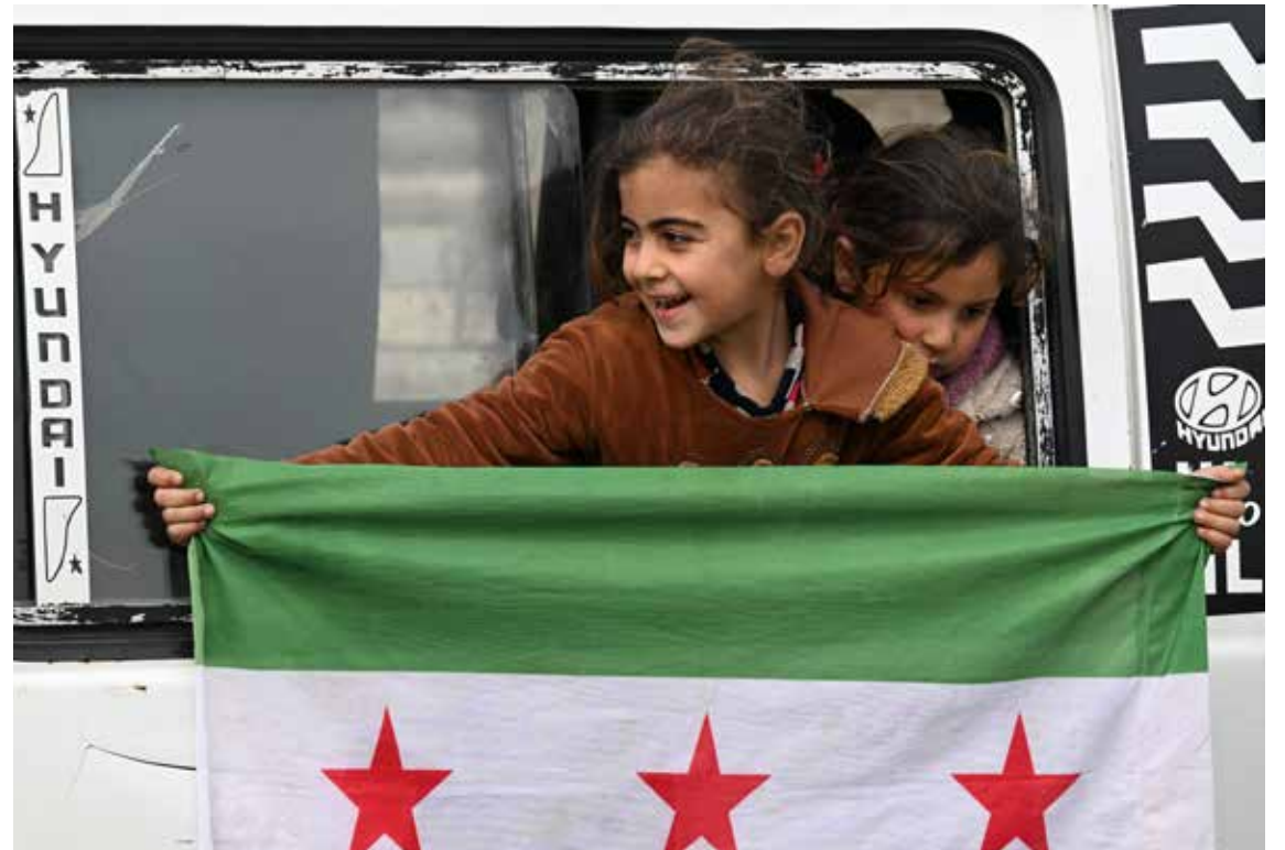
HOMS: A girl holds an independence-era Syrian flag out of the window of a bus carrying displaced Syrians returning home after years of displacement in the northern Aleppo province, at the entrance of the central city of Homs on February 10, 2025.

Touring the building that housed the press center, Abdel Qader Al-Anjari, 40, said he was an activist helping foreign journalists at that time. "Here