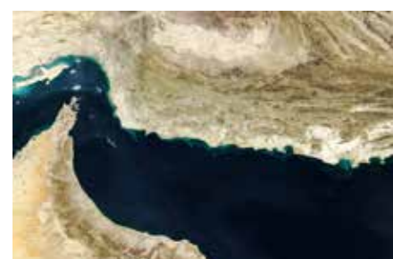
This handout natural-color image acquired with MODIS on NASA's Terra satellite shows the Gulf of Oman and the Makran region (center) in southern Iran and southwestern Pakistan, and the Strait of Hormuz (left) and the northern coast of Oman (bottom).