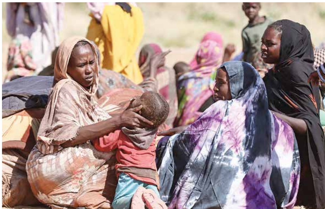
TAWILA: Displaced Sudanese women and children gather at a camp near the town of Tawila in North Darfur.