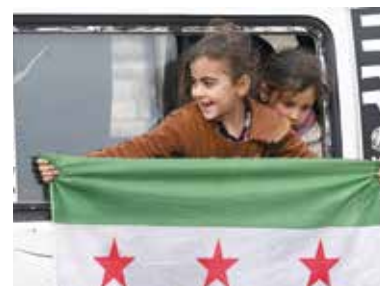
Syrians return to Homs, 'capital of the revolution'