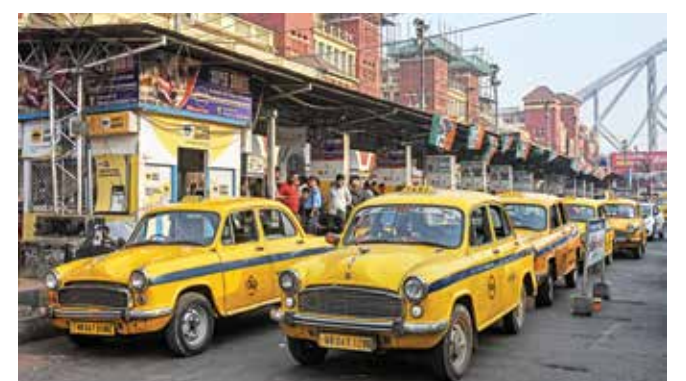
Hindustan Ambassador yellow taxis are parked in queues as drivers wait for passengers at the Howrah railway station in Kolkata.

But its importance has shrunk dramatically since that heyday, first with the relocation of India's capital to Delhi in 1911 and then with Mumbai's ascension as the country's most important commercial hub. Many of Kolkata's younger generations have left in search of better opportunities elsewhere, giving it a median