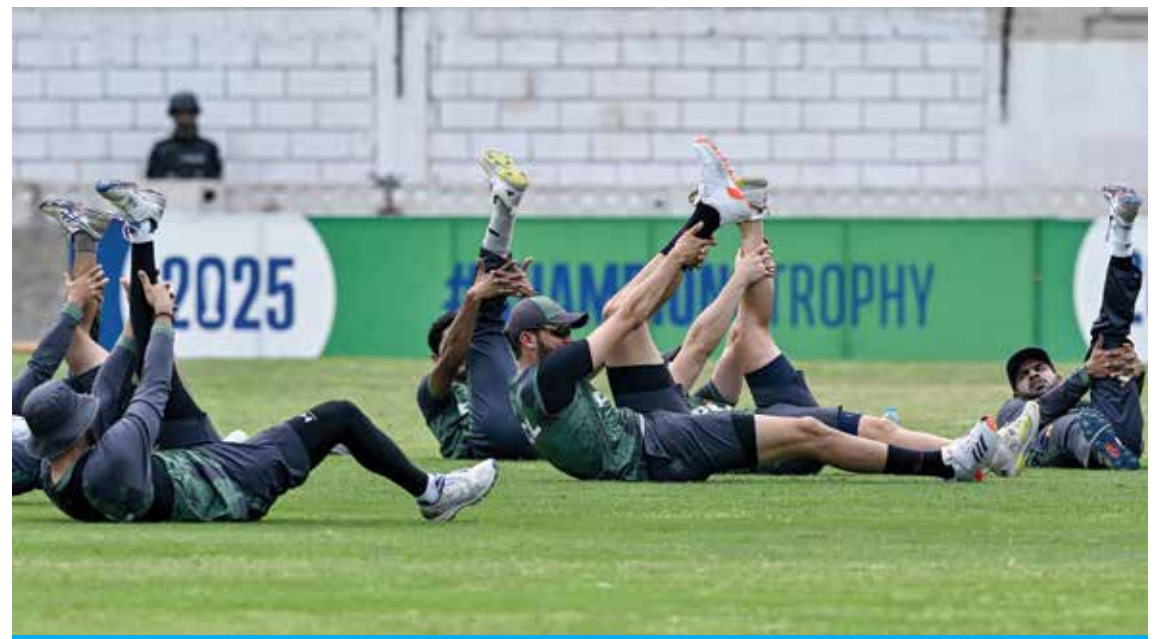
KARACHI: Pakistan's players attend a practice session ahead of their ICC Men's Champions Trophy one-day international (ODI) cricket match against New Zealand at the National Stadium in Karachi on February 17, 2025.

Although militancy is still a threat in Pakistan, the violence is nearly entirely limited to the remote border regions from north to south, far away from the stadiums. With the capital Islamabad placed in lockdown, Pakistan recently hosted a summit of the Shanghai Cooperation Organization and a