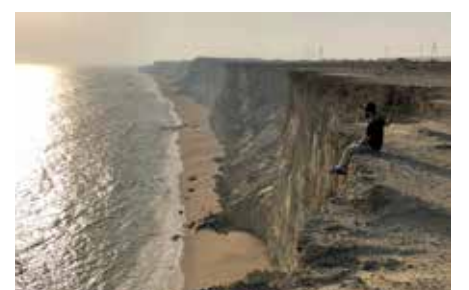
A tourist gazes out over the sea from the top of a dune in a desert landscape near Chabahar in Iran's southern Sistan-Baluchistan province.