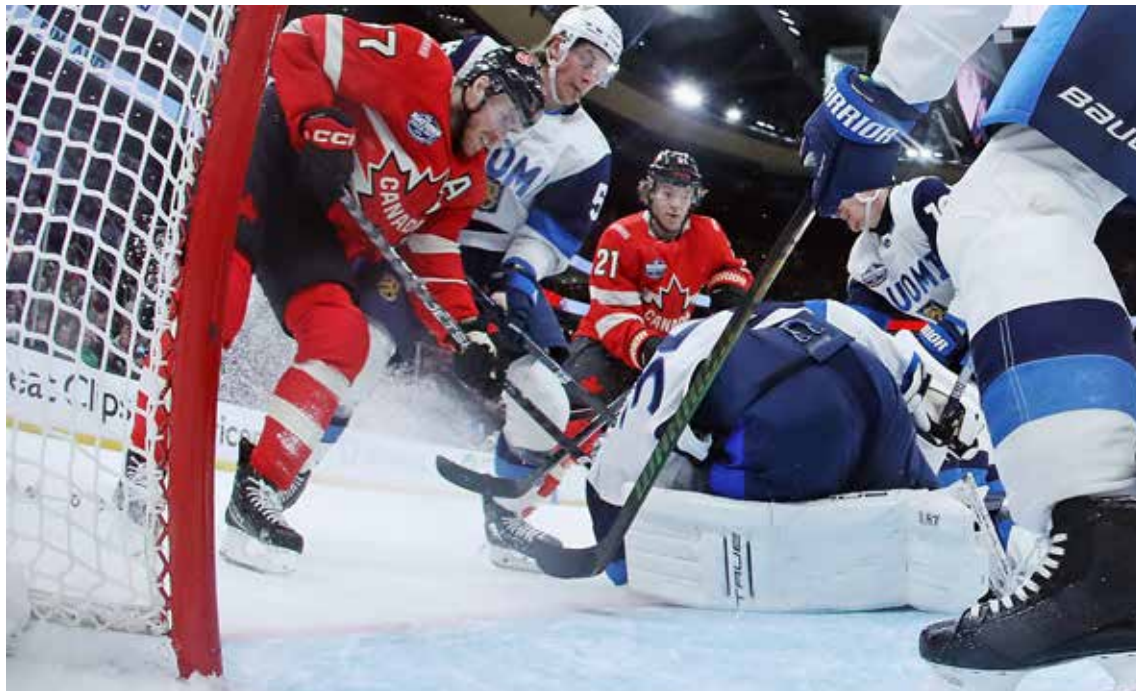
BOSTON: Connor McDavid #97 and Brayden Point #21 of Team Canada are stopped by Kevin Lankinen #32 of Team Finland during the first period in the 4 Nations Face-Off game at TD Garden on February 17, 2025 in Boston, Massachusetts.

LONDON: George Russell insisted he had "no concerns" about world champion Max Verstappen heading into the new Formula One campaign despite their furious