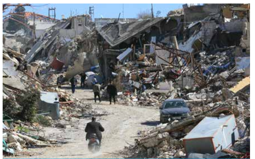
ADAISEH, Lebanon: People inspect their destroyed homes in this southern village on Feb 18, 2025, following the withdrawal of Zionist troops.