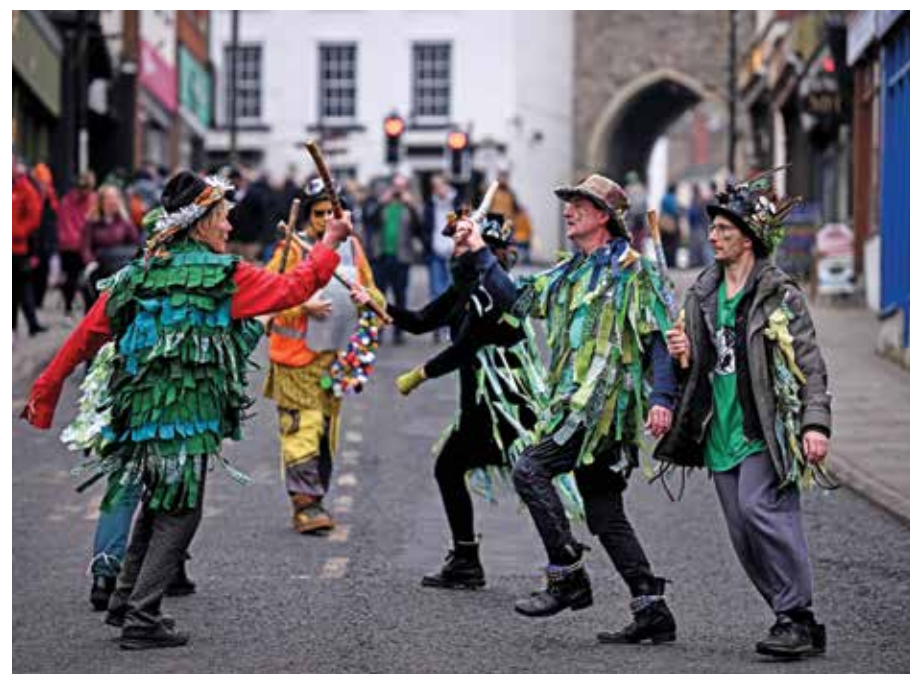
Morris dancers perform in the streets in the center of Chepstow.