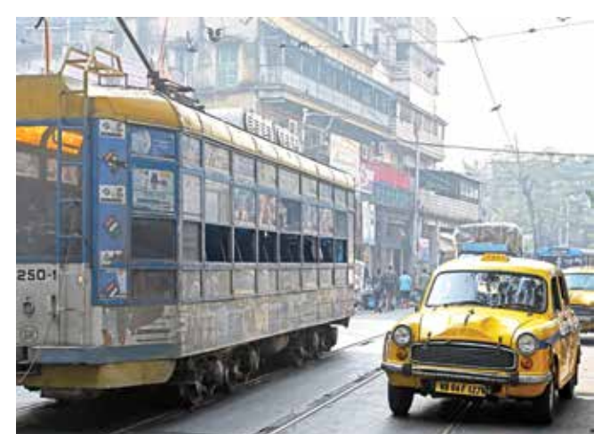
Passengers ride a Hindustan Ambassador yellow taxi past a tram along a street in Kolkata.