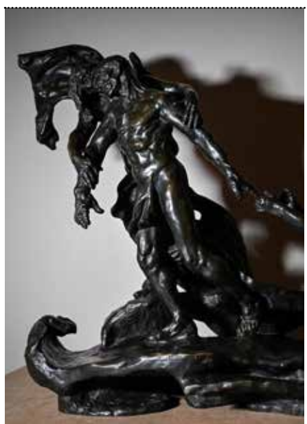
A version of French sculptor Camille Claudé's famous bronze sculpture "L'Age mur" ("The Mature Age") found by chance in an uninhabited flat, in Paris.

A bronze sculpture by French sculptor Camille Claudé thought to evoke her separation with fellow artist and lover Auguste Rodin was auctioned off in France Sunday for more than $3 million. Claudé, whose life and tortured love affair with Rodin has inspired several films, destroyed much of her work before her brother confined her to a psychiatric hospital in 1913. The artist sculpted "The Mature Age" after she broke off with Rodin, who was two decades older, seeking to create a name for herself in her own right after years as his assistant.