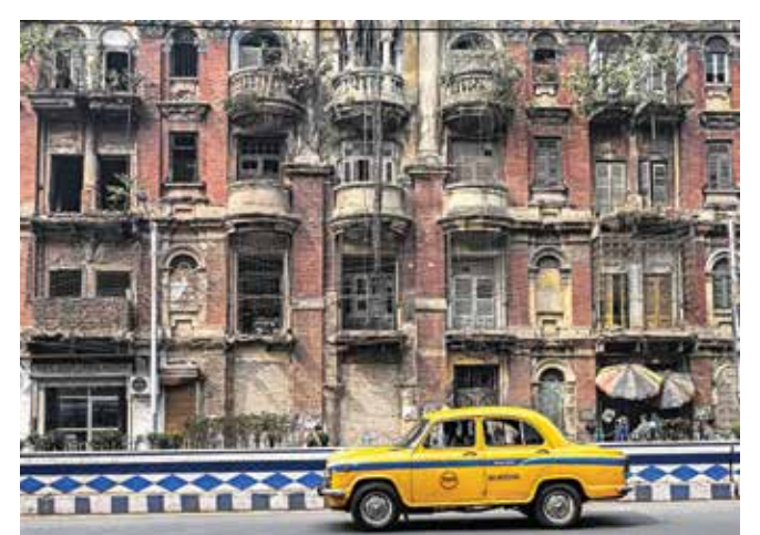
Driver of a Hindustan Ambassador yellow taxi rides past a heritage building in Kolkata.