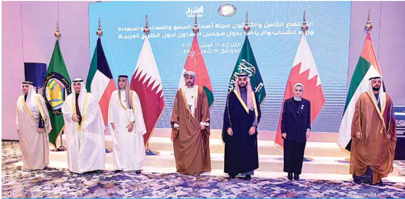
Group photo of the Gulf Ministers of Youth and Sports.