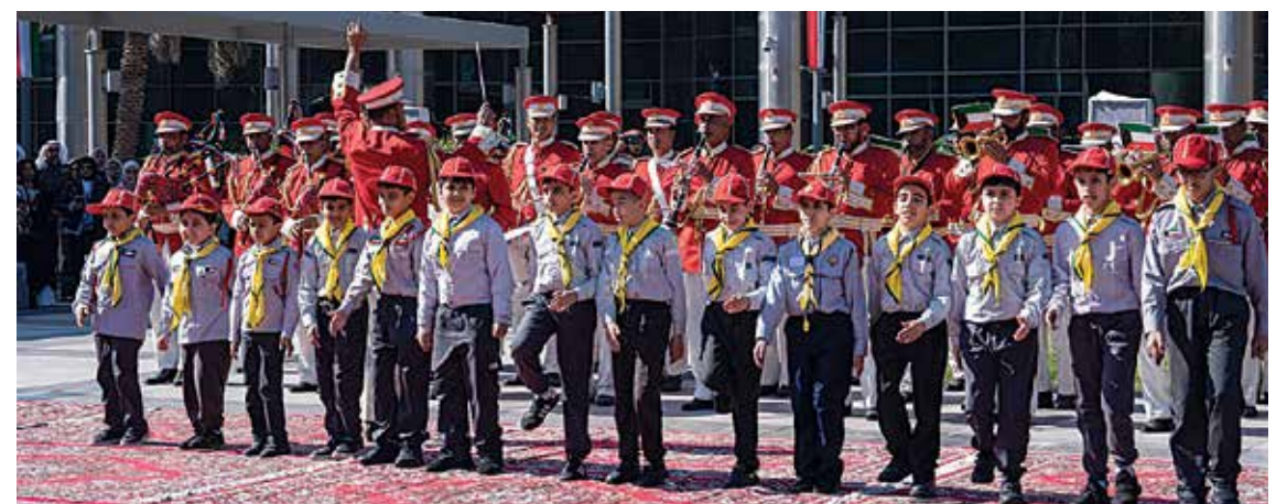
Kuwaiti Army Brass Band participates in the Public Authority for Applied Education and Training's celebration.

by students from the schools of Jahra Governorate, along with an accompanying exhibition that featured a range of national activities and