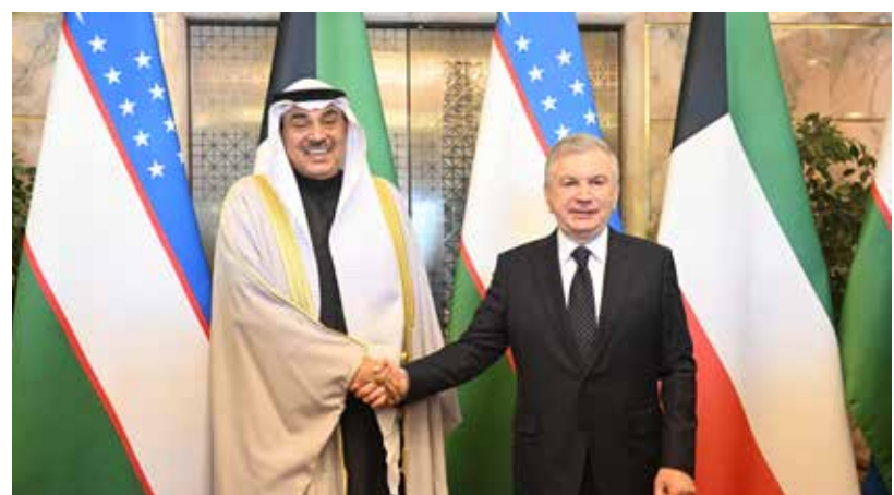
KUWAIT: Uzbekistan's President Shavkat Mirziyoyev meets at his residence in Bayan Palace HH the Crown Prince Sheikh Sabah Al-Khaled Al-Hamad Al-Sabah, before concluding his official visit to Kuwait on Feb 18, 2025. (See Page 3)

RIYADH: The United States and Russia said on Tuesday they had agreed to press ahead with efforts to end the war in Ukraine after holding talks in the Saudi capital at which Kyiv was not represented. The 4-1/2-hour meeting in Riyadh marked a crucial moment – the first time that US and Russian officials have sat down together to discuss ways to halt the deadliest conflict in Europe since World War Two. Ukraine says it will not accept any deal imposed on it without its consent.