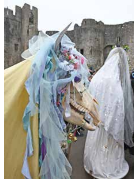
A performer dressed as The Mari Lwyd.