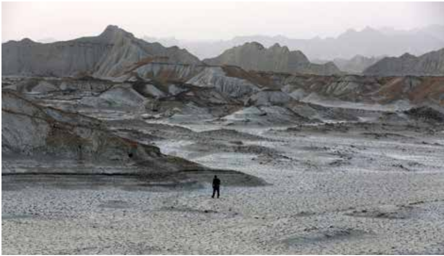
A man walks at the "Mars Mountains" site near Chabahar in Iran's southern Makran region in the Sistan-Baluchistan province.