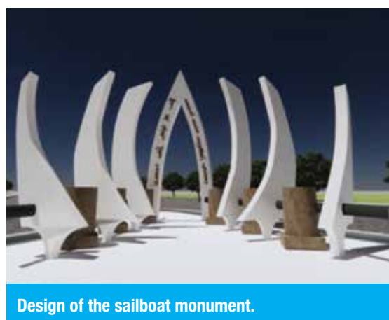
Design of the sailboat monument.