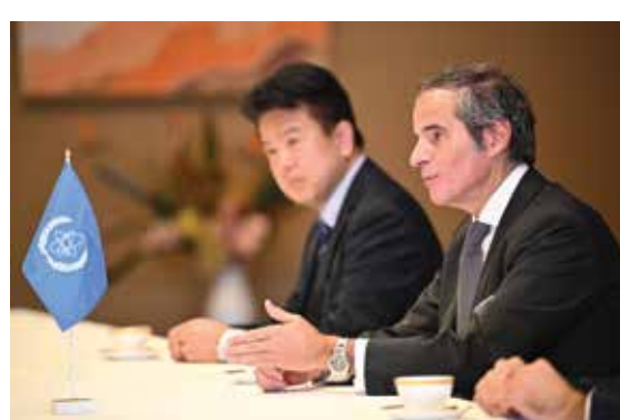
TOKYO: International Atomic Energy Agency (IAEA) Director General Rafael Mariano Grossi (right) speaks to Japanese Foreign Minister Takeshi Iwaya (not seen) during a meeting in Tokyo on February 18, 2025.