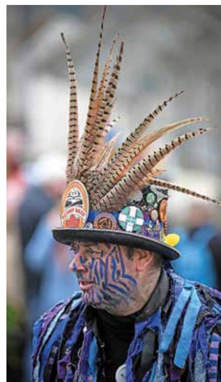
A Morris dancer looks on as he performs in the streets in the center of Chepstow.

“Wassail!” yelled the crowd. “Apple Cider for everyone!” In an orchard by a Welsh castle, hundreds of people gathered to wish good health to the apple trees in a centuries-old tradition enjoying a revival. As mulled cider -- a warm drink made from fermented apple juice -- was handed around, a dozen hobby horses swayed eerily to folk music. Made from real horses’ skulls mounted on poles and carried by someone cloaked in a bed sheet, they are bedecked in ribbons with shiny baubles glinting in the eye sockets.