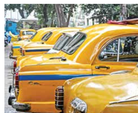
A man washes a Hindustan Ambassador yellow taxi outside a railway station in Kolkata.