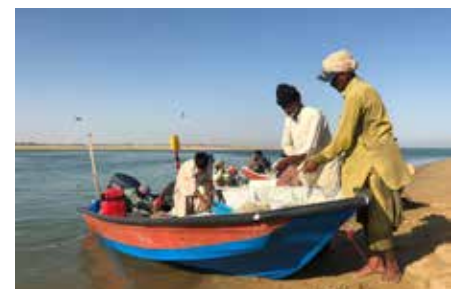
Baluchi fishermen return from waters near Pakistan at the Makran coast in Iran's southern Sistan-Baluchistan province.