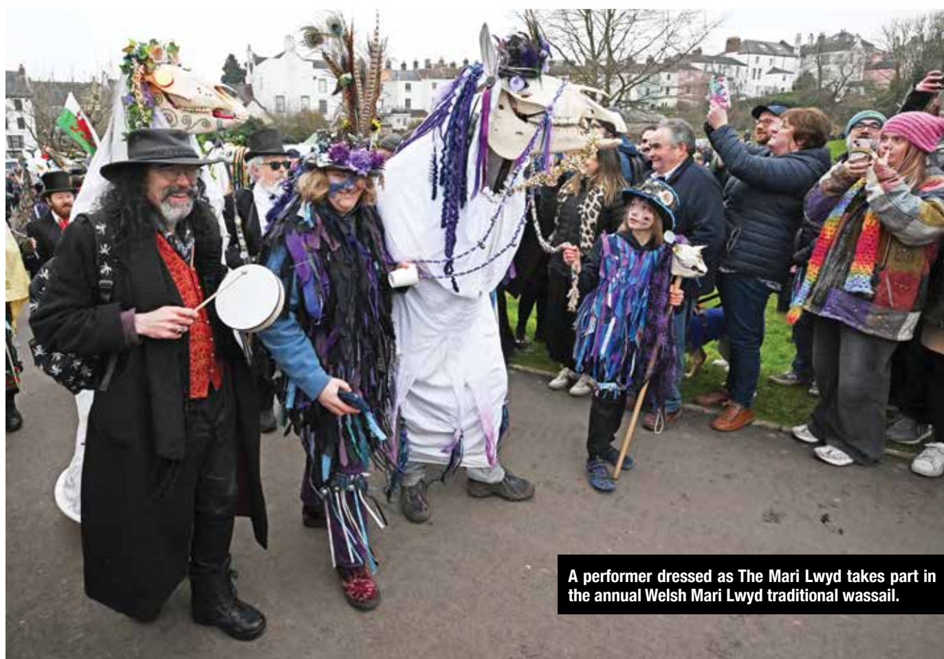
A performer dressed as The Mari Lwyd takes part in the annual Welsh Mari Lwyd traditional wassail.