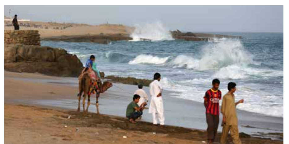
Men gather on the beach near Chabahar in Iran's southern Makran region in the Sistan-Baluchistan province.