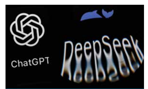
A tablet screen displays the logo of DeepSeek, a Chinese artificial intelligence company that develops open-source large language models, and the logo of OpenAI's artificial intelligence chatbot ChatGPT.

The unprecedented cost-cutting drive has raised conflict-of-interest questions, given that many of those agencies have regulatory oversight on elements of Musk's sprawling business empire. "Grok is to understand the universe," Musk said at the start of the Grok 3 launch presentation.