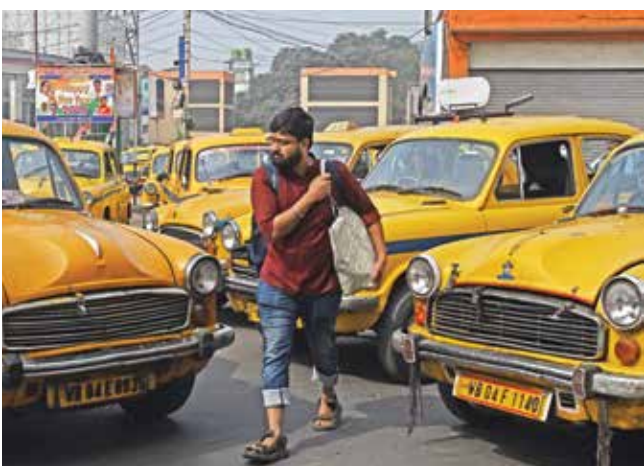
A passenger walks past Hindustan Ambassador yellow taxis parked outside a railway station in Kolkata.