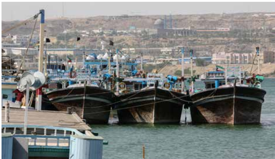
Fishing boats are moored at a port in Chabahar in Iran's southern Makran region in the Sistan-Baluchistan province.