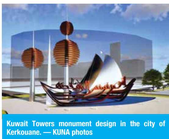
Kuwait Towers monument design in the city of Kerkouane.

He mentioned that their participation aims to introduce the methods of the alliance's work and its approach to various issues, alongside its goals, strategies and most significant achievements. Additionally, it aims to introduce its relationship with non-member states like Kuwait, which is a strategic ally outside NATO countries, having strengthened its pivotal partnership with the alliance by establishing the regional center for the Istanbul Peace Initiative in the country since 2017. — KUNA