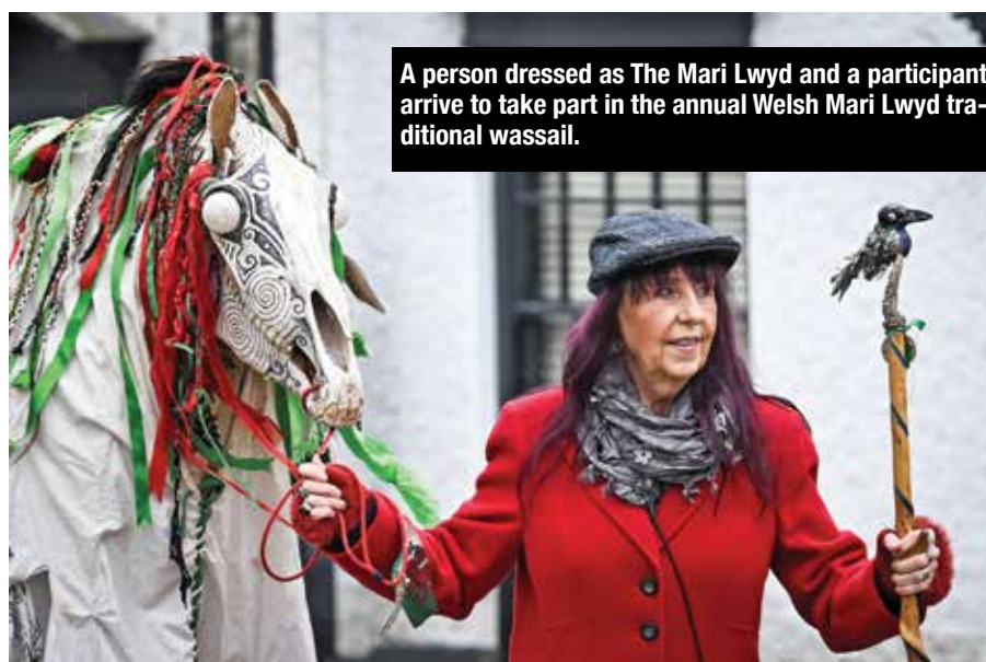
A person dressed as The Mari Lwyd and a participant arrive to take part in the annual Welsh Mari Lwyd traditional wassail.

Traditionally held on Twelfth Night, the Christian festival on the last night of the 12 days of Christmas, wassailing is intended to ward off bad spirits from orchards, ensuring a bountiful crop of