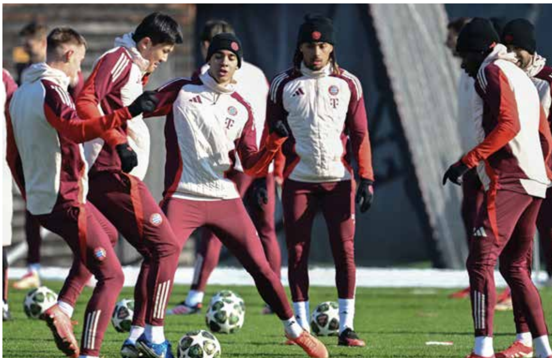
MUNICH: Bayern Munich's German midfielder #42 Jamal Musiala (3rd L) and teammates attend a training session on the eve of the UEFA Champions League Knockout round play-off second Leg match against Celtic on February 17, 2025 in Munich.

Kompany said Celtic were "always dangerous, but so are we. It's a home game, we'll look to make that play to our advantage." Bayern midfielder Jamal Musiala insisted the club had "no excuses" de-