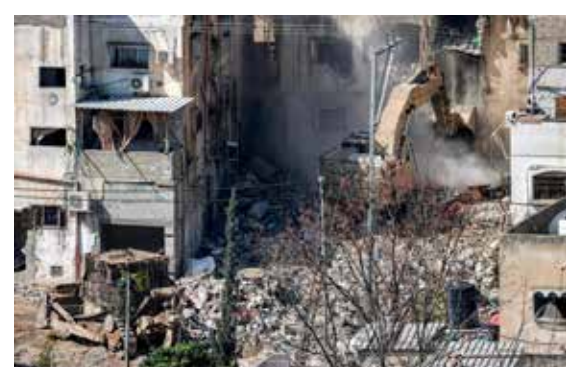
TULKAREM: A Zionist army excavator demolishes a residential building in this camp for Palestinian refugees in the occupied West Bank on Feb 18, 2025.