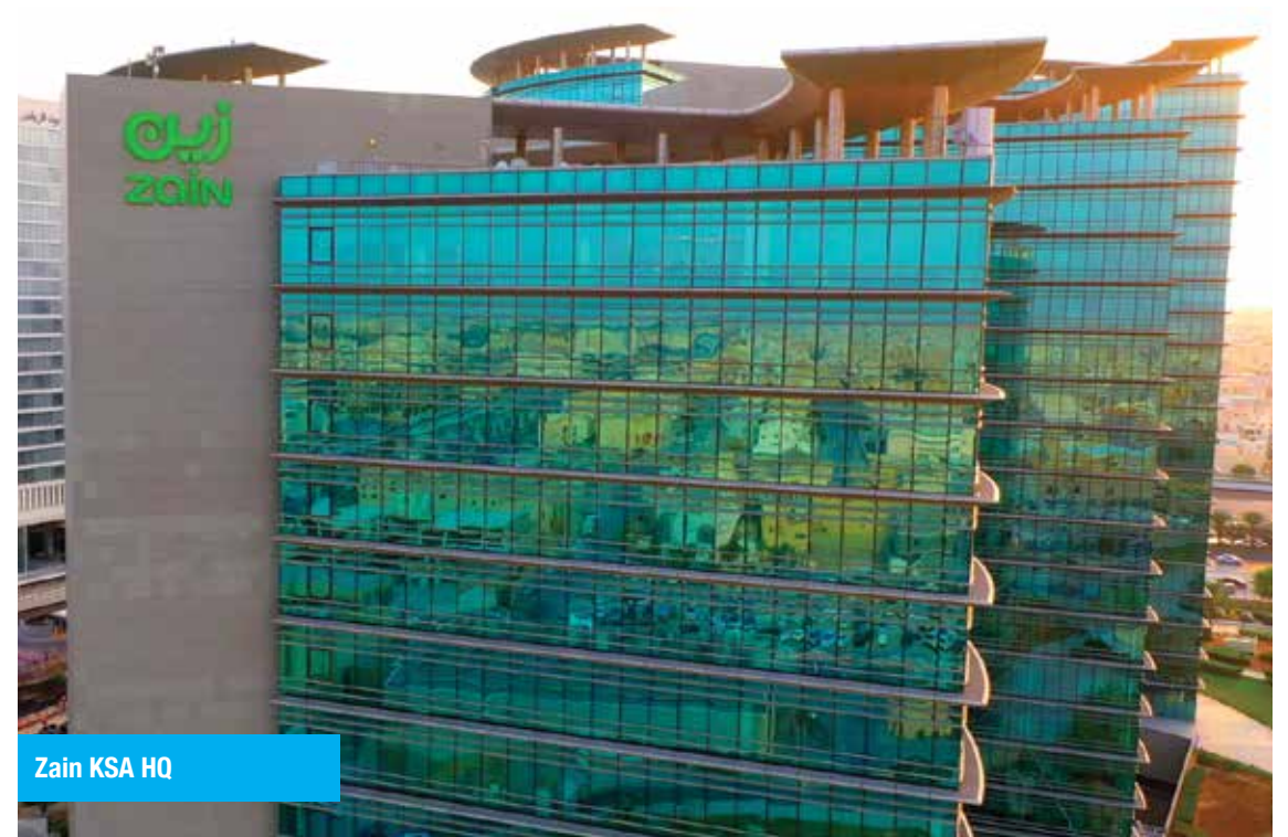
Zain KSA HQ