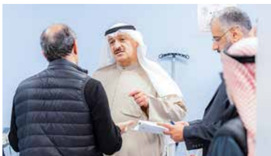
KUWAIT: Minister of Health Dr Ahmad Al-Awadhi inaugurates the new medical clinic at Jazeera Airways Terminal 5 (T5). — KUNA

Al-Budaiwi also asserted that the Cooperation Council will persist in its efforts to enhance the status of youth and achieve the visions of our national countries toward a brighter future, extending his sincere thanks and gratitude to Minister Al-Mutairi for the generous hosting and strenuous efforts in organizing this meeting. Al-Budaiwi praised the sports and youth achievements made by the Gulf countries recently, illustrating the interest and care of the leaders of the GCC countries for these two important sectors, and congratulated Kuwait on the occasion of the 64th anniversary of National Day and the 34th anniversary of Liberation Day. — KUNA