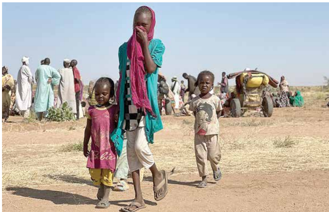
TAWILA: A Sudanese woman, accompanied by children, walks at a camp near the town of Tawila in North Darfur.