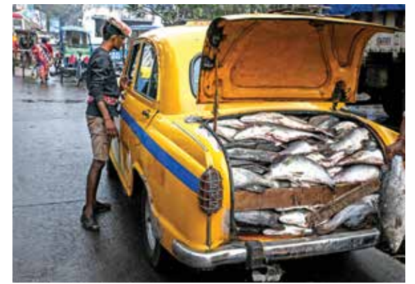
A laborer looks into a Hindustan Ambassador yellow taxi transporting fish at a wholesale market in Kolkata.