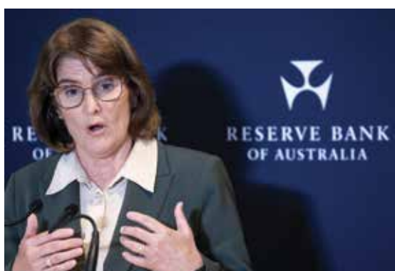
SYDNEY: Australia's Reserve Bank Governor, Michele Bullock, speaks during the Monetary Policy Decision media conference in Sydney on February 18, 2025.

"This is the soft landing that we have been planning for and preparing for, but we can't be complacent about the months and years ahead."