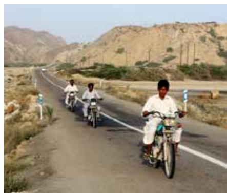
Men ride motorcycles at the "Mars Mountains" site near Chabahar in Iran's southern Makran region in the Sistan-Baluchistan province.

Still, many oppose the possible relocation. "This would be a completely