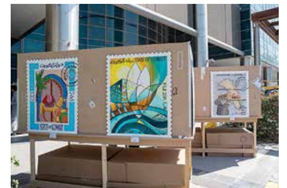
Part of the exhibition.