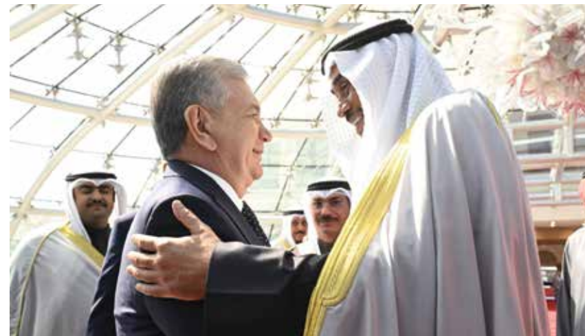
KUWAIT: President of Uzbekistan Shavkat Mirziyoyev and his accompanying delegation left the country on Tuesday after an official visit to Kuwait during which he held official talks with His Highness the Amir Sheikh Meshal Al-Ahmad Al-Jaber Al-Sabah. His Highness the Crown Prince Sheikh Sabah Al-Khaled Al-Hamad Al-Sabah was at the forefront of those who saw him off at the airport.

KUWAIT: A joint statement issued following the official visit of the President of the Republic of Uzbekistan to Kuwait stressed the importance of enhancing political dialogue, trade and economic relations, cultural and humanitarian exchanges, and cooperation between security and defense agencies and law enforcement agencies.