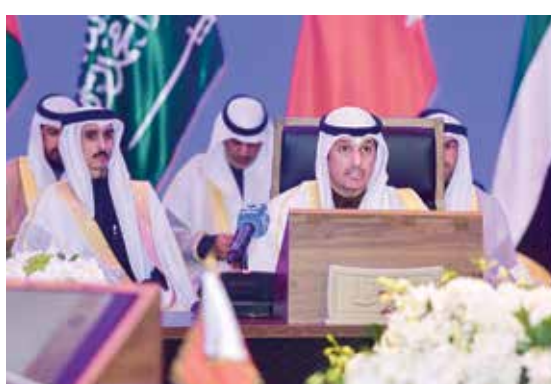
Minister of Information and Culture and Minister of State for Youth Affairs Abdulrahman Al-Mutairi chairs the 38th meeting of the Gulf Ministers of Youth and Sports.

Minister Al-Mutairi explained that empowering youth lies in providing them with opportunities to launch into