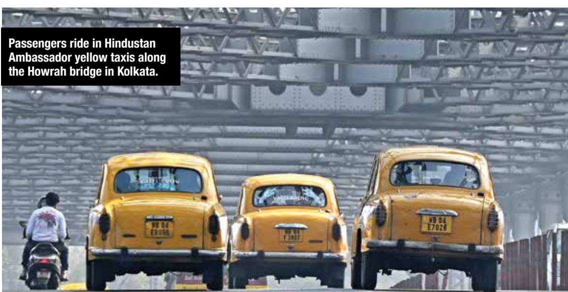
Passengers ride in Hindustan Ambassador yellow taxis along the Howrah bridge in Kolkata.