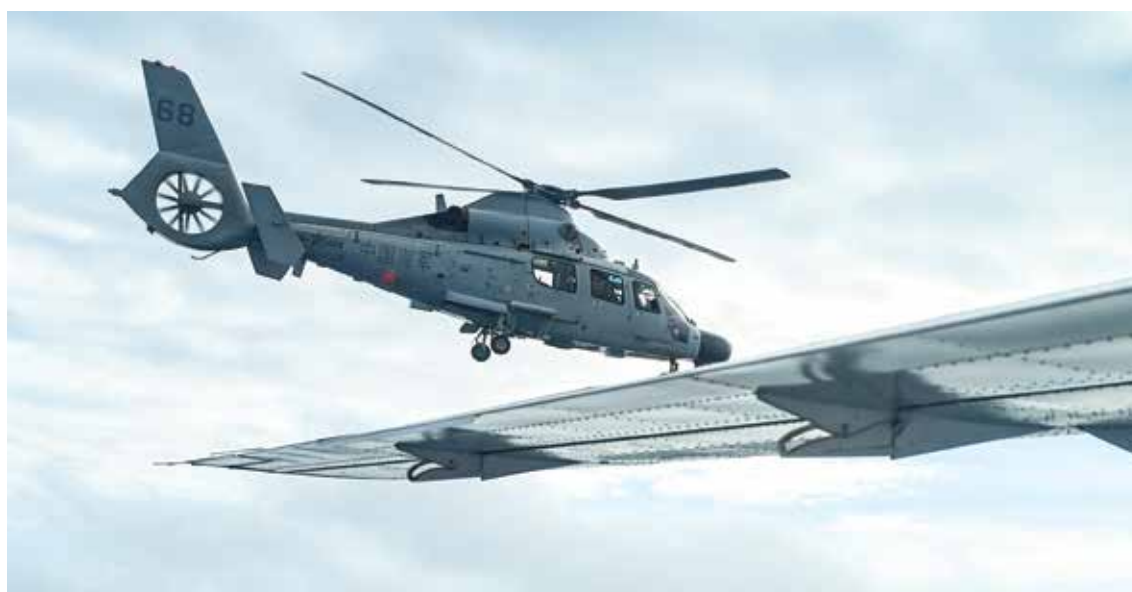
An aircraft identified by the Philippine Coast Guard as Chinese Navy helicopter (left) flies near the Bureau of Fisheries and Aquatic Resources (BFAR) plane during an aerial reconnaissance flight at Scarborough Shoal in the South China Sea on February 18, 2025.