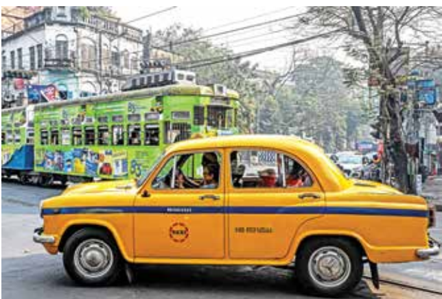
Passengers ride in a Hindustan Ambassador yellow taxi past a tram at an intersection in Kolkata.

The city's skewed demographics prompted its pre-eminent novelist Amit Chaudhuri to once quip that while Delhi was for seeking power and Mumbai was for chasing riches, Kolkata was for visiting