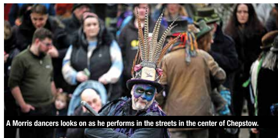
A Morris dancer looks on as he performs in the streets in the center of Chepstow.