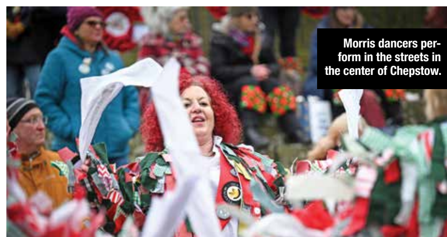
Morris dancers perform in the streets in the center of Chepstow.