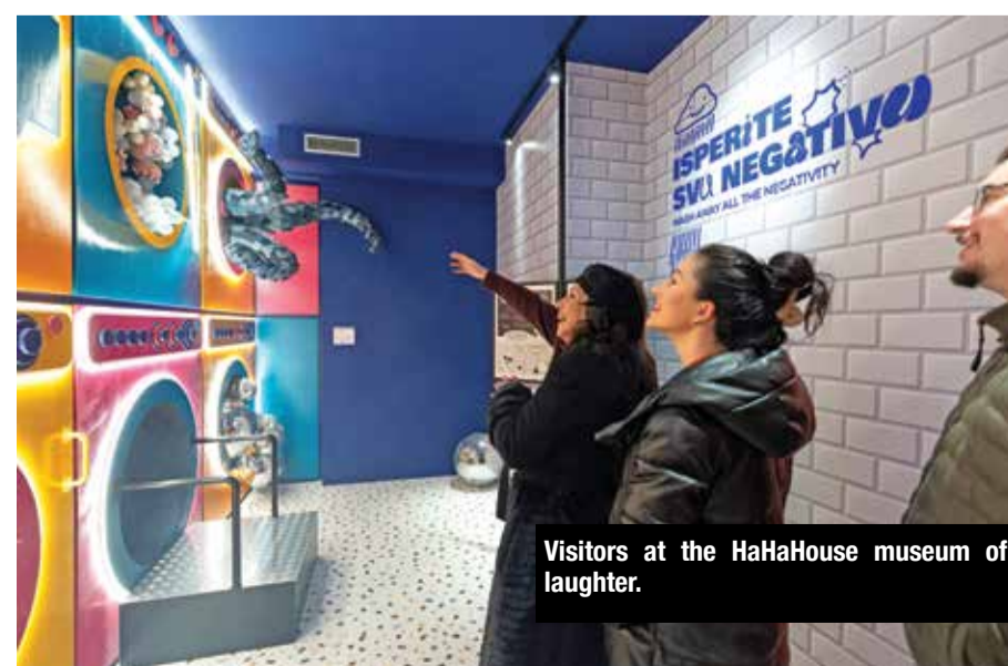
Visitors at the HaHaHouse museum of laughter.