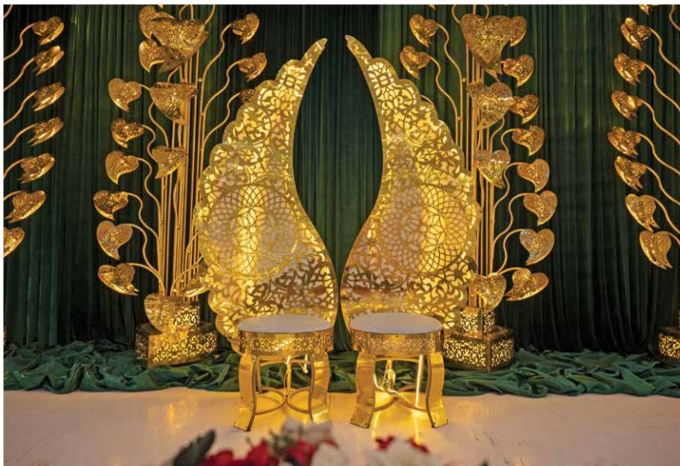
A decorated wedding hall at night in Kabul.