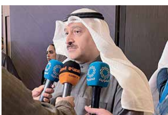
Minister of Health Dr Ahmad Al-Awadhi inaugurates the 11th Anesthesia Conference on Saturday.

Minister Al-Awadhi said that this program will result in the graduation of national cadres that contribute to supporting the ministry and providing integrated medical services to citizens, pointing out that the implementation of modern work