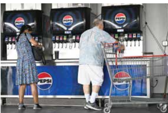
HAWTHORNE: Customers fill up Pepsi branded cups at a PepsiCo soda fountain outside a Costco Wholesale warehouse store in Hawthorne, California.