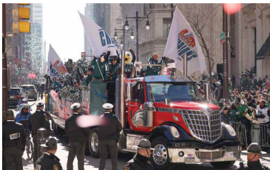
PHILADELPHIA: The Philadelphia Eagles and fans celebrate during their Super Bowl Championship parade in Philadelphia, Pennsylvania.

Laurence St-Germain became Canada's first women's slalom world champion for 63 years when she won a shock gold in the last world champs in Courchevel/Meribel in 2023. But the 30-year-old, who is still yet to claim a World Cup podium, was one of a large number of skiers who failed to finish the first leg.