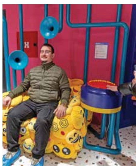
A man sits on a "sound machine".