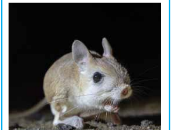
A rodent from the jerboa family found in the desert area in Kuwait

Al-Zaidan added that the size of the jumping jerboa ranges from approximately 10 to 25 centimeters and appears only at night when the weather is cooler in the desert. It is a solitary creature that digs burrows in the sand in a spiral opposite to the direction of the wind. Its hands range in depth from one to two meters and can dig side holes that reach the surface to help it escape. He explained that these jerboas block the entrances to their burrows with