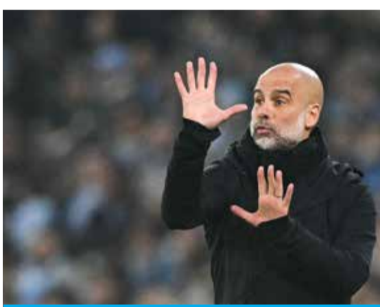
LONDON: Manchester City's Spanish manager Pep Guardiola reacts during the UEFA Champions League football match.

Responding to criticism of City's spluttering dynasty after Tuesday's 3-2 home defeat against Real Madrid in the Champions League play-off round first leg, Guardiola took a tetchy swipe at Liverpool. "We took all the records in England. Who would do 100 points now in modern football? I'm waiting," Guardiola told reporters on Friday.