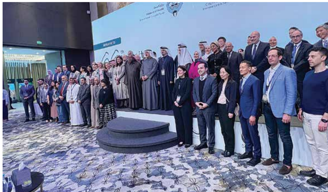
During the 11th Anesthesia Conference in Kuwait on Saturday.

KUWAIT: Minister of Health Dr Ahmad Al-Awadhi said that the field of anesthesia has recently witnessed remarkable development in doctors' skills and expertise, especially in dealing with complex cases, indicating that as a result of this development, anesthesia departments were able to perform more complex surgeries than before.