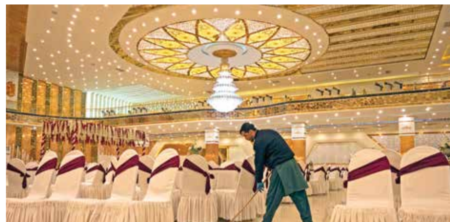
Afghan workers mop a wedding hall at night in Kabul.