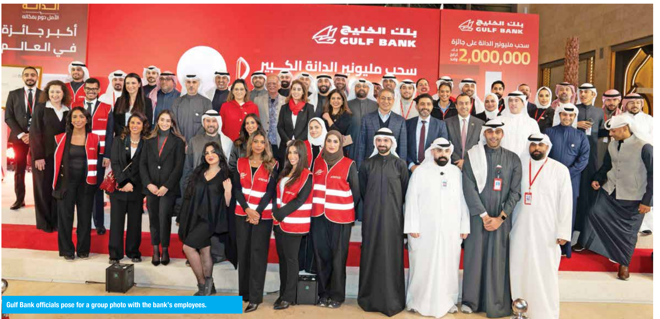
Gulf Bank officials pose for a group photo with the bank's employees.

As part of its commitment to enhancing financial awareness across all segments of society and supporting the "Diraya" banking awareness campaign – led by the Central Bank of Kuwait in collaboration with the Kuwait Banking Association – Gulf Bank actively engaged attendees through interactive competitions and educational messages. The event featured a quiz on key campaign topics, offering cash prizes to the winners.