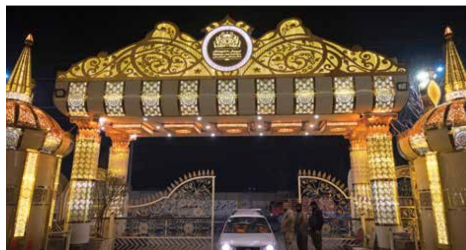
Afghan security guards stand at an entrance of a wedding hall at night in Kabul.