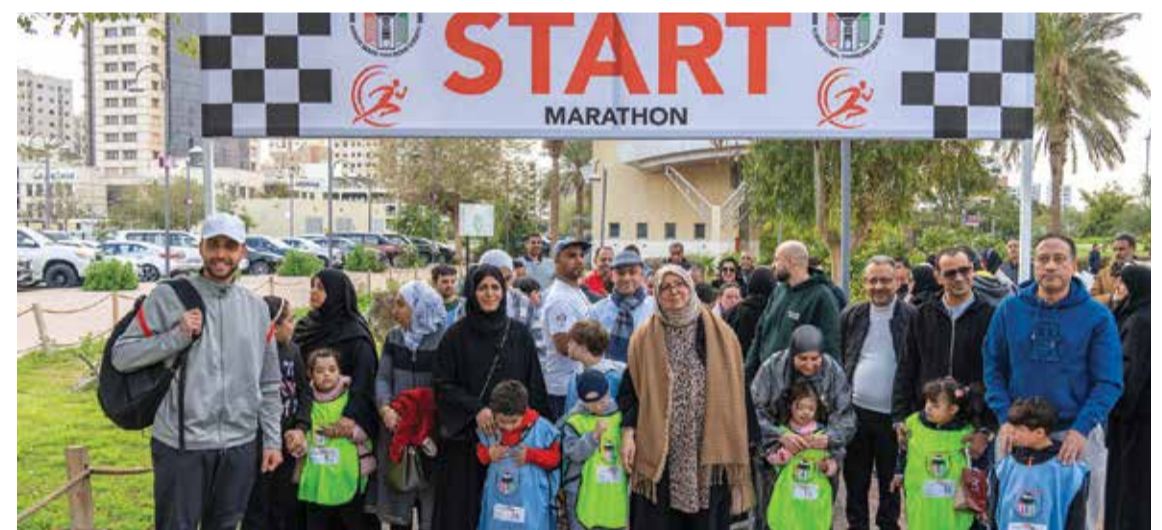
KUWAIT: The Kuwait Down Syndrome Association (KDSA) launched the second edition of the "Our Path is One" marathon on Saturday.