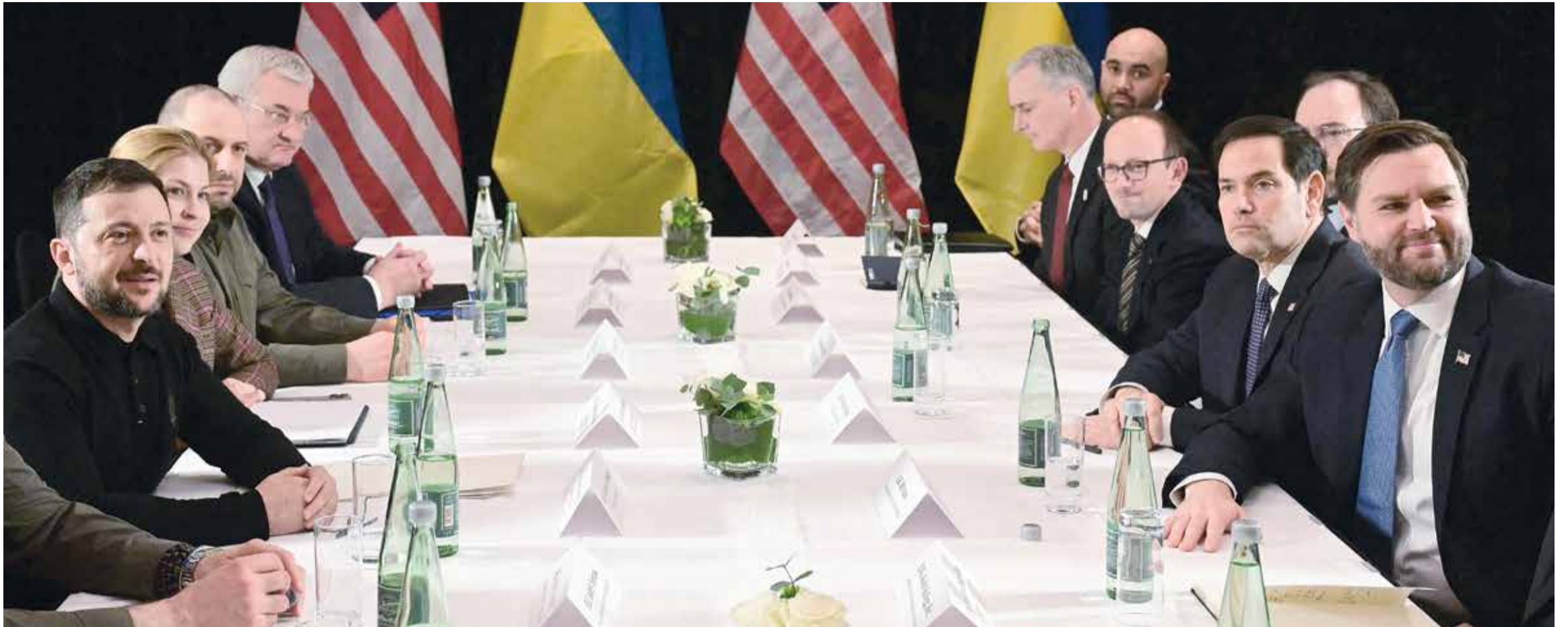
MUNICH: US Vice President JD Vance (right), US Secretary of State Marco Rubio (2nd right) and Ukrainian President Volodymyr Zelensky (left) meet on the sidelines of the 61st Munich Security Conference (MSC) in Munich, southern Germany on February 14, 2025.