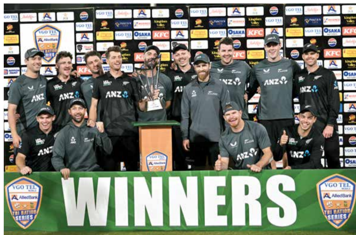
KARACHI: New Zealand's players pose with the trophy after winning the Tri-Nation series final one-day international (ODI) cricket match between Pakistan and New Zealand at the National Stadium in Karachi.

Pakistan 242 all out in 49.3 overs (Mohammad Rizwan 46, Salman Agha 45; W. O'Rourke 4-43) v