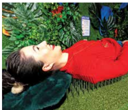
A woman lays on the "Bed of Nails" as she visits the HaHaHouse museum of laughter.

A new museum of laughter is offering to put people through the spinner to wash away the negativity of modern life. Visitors to the HaHaHouse in the Croatian capital Zagreb are blasted with a puff of white smoke once they step inside to blow away their worries before climbing into a "giant washing machine". The "centrifuge of life" then whips them away Willy Wonka-style down a twisting slide into a pool filled with little white balls where their journey to a happier place starts.