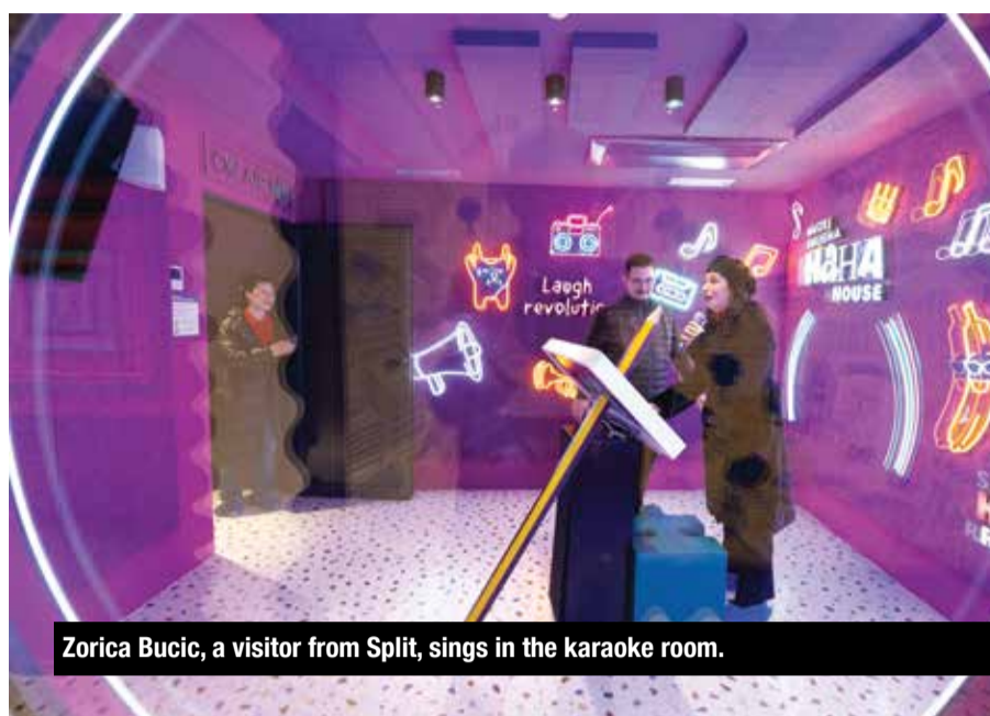
Zorica Bucic, a visitor from Split, sings in the karaoke room.