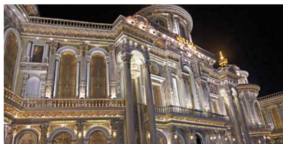
An illuminated wedding hall at night in Kabul.