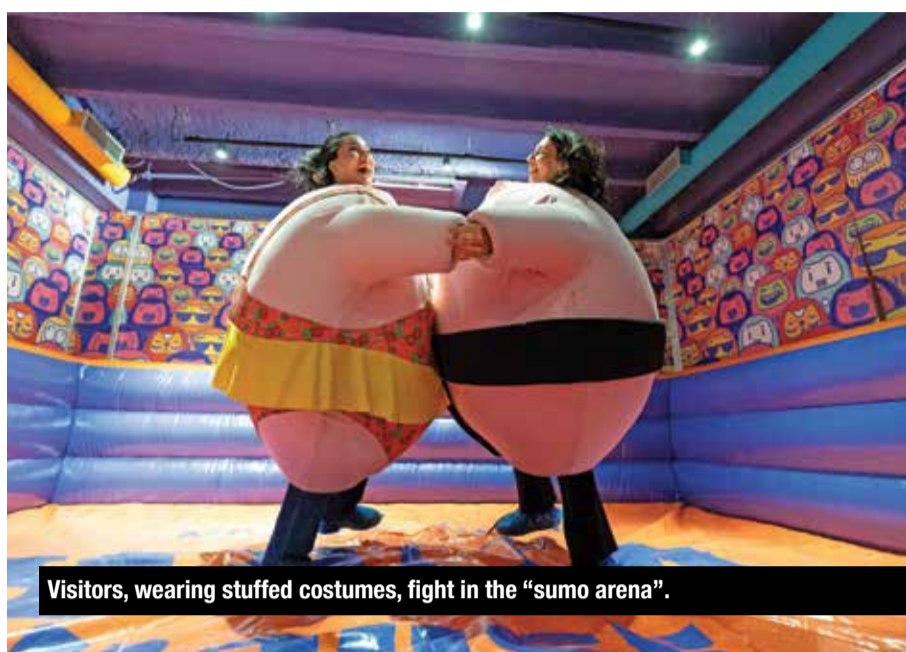
Visitors, wearing stuffed costumes, fight in the "sumo arena".