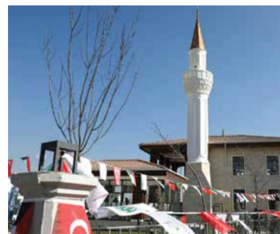
The new mosque inaugurated by Kuwait's Sheikh Abdullah Al-Nouri Charity Association in Ankara.

He said that the association is proud to be part of "this blessed journey that enjoys the generous support and patronage of the political leadership that continues Kuwait's pioneering journey in giving and charitable work inside and outside Kuwait. He said the mosque, which was inaugurated on Sat-