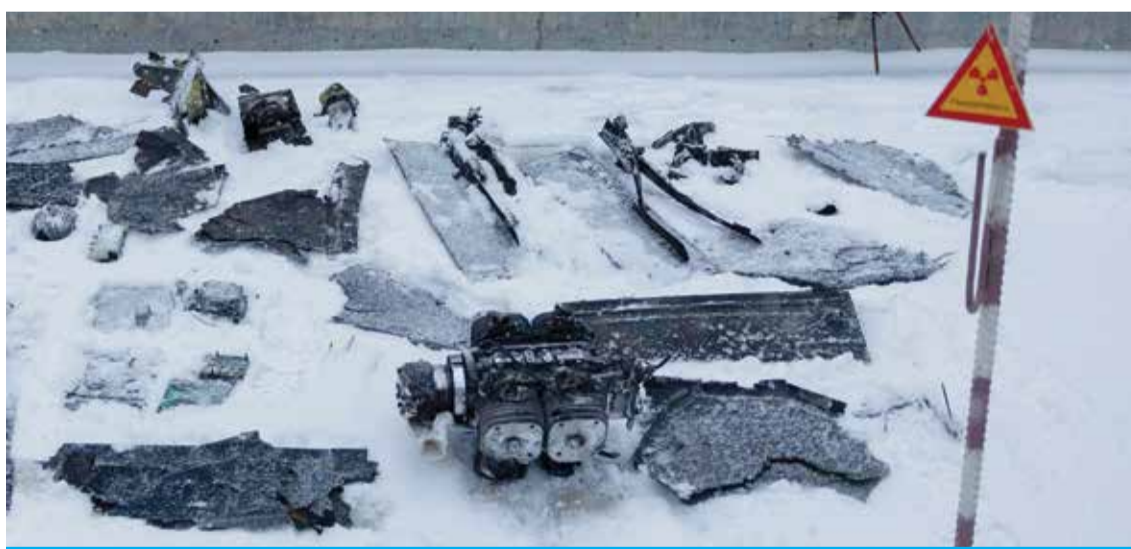
CHERNOBYL: This photograph shows parts of an explosive device at the New Safe Confinement (NSC), which protects the remains of reactor 4 of the former Chernobyl Nuclear Power Plant to contain radiation, following a drone attack on February 14, 2025, amid the Russian invasion of Ukraine.

“There is no question of any strikes on such nuclear infrastructure sites,” Russian President Vladimir Putin’s spokesman Dmitry Peskov told reporters. “Any claims that this was the case do not correspond to reality. The Russian military does not do this,” he said, after stating that he did not have “exact information” about the reported hit on Chernobyl. EU foreign policy chief Kaja Kallas meanwhile said