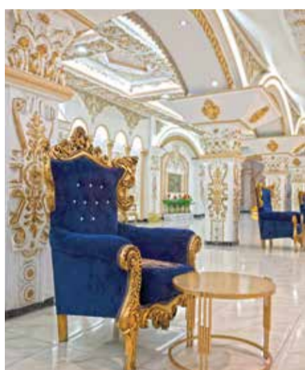
An empty wedding hall in Kabul.