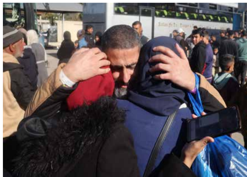
GAZA: Former Palestinian prisoners, released as part of the sixth hostage-prisoner exchange, are welcomed by friends and relatives upon arriving at the European Hospital in Khan Yunis in the southern Gaza Strip on February 15, 2025.

GAZA: Palestinian militants released three hostages on Saturday in exchange for hundreds of Palestinian inmates freed by Zionists, completing the latest swap despite fears the Gaza truce deal was near collapse. An AFP journalist saw masked Hamas gunmen parade the hostages onto a stage in front of a crowd in Gaza's southern city of Khan Yunis, where they were made to make statements into a microphone before being handed over to the Red Cross and taken back to Zionist territory.