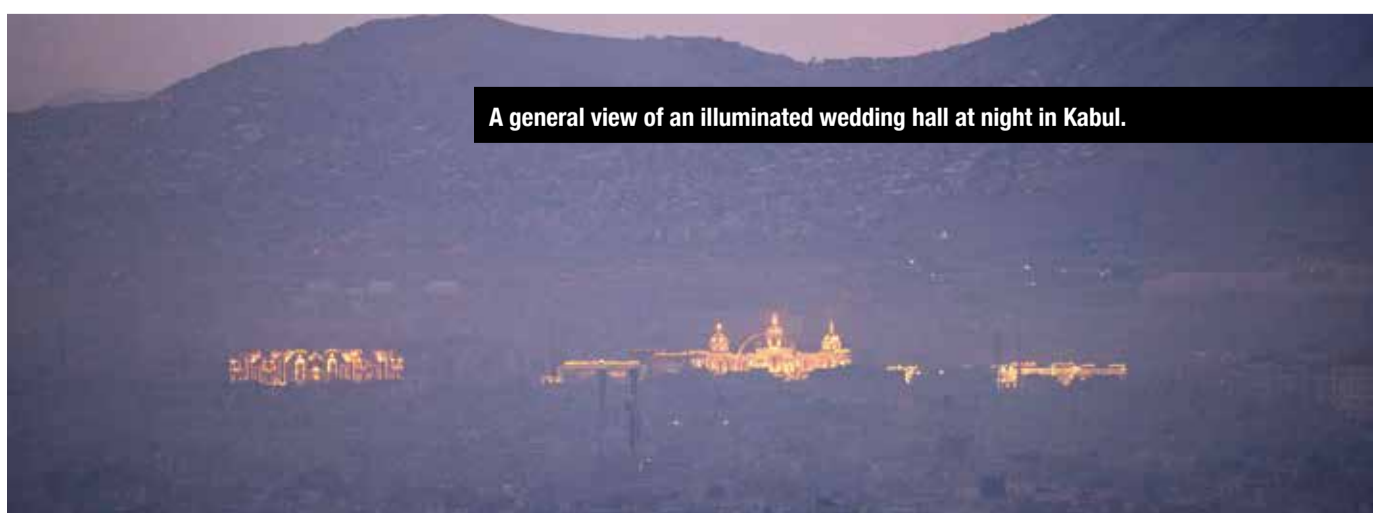
A general view of an illuminated wedding hall at night in Kabul.