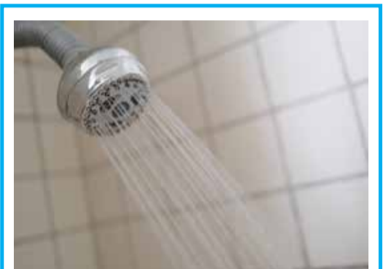
LOS ANGELES: This illustration photo shows a high-flow showerhead in Los Angeles. Gas stoves, shower heads, incandescent light bulbs: since his return to the White House, Donald Trump has had his sights set on environmental standards for many everyday items, with the motto: it was better before. — AFP

Pistorius blasted Vance, saying “democracy was called into question by the US vice president for the whole of Europe”. “He is comparing conditions in parts of Europe with those in authoritarian regimes... that is not acceptable.” — AFP