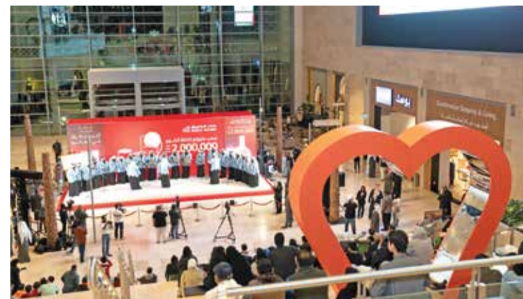
TV band presents traditional songs.