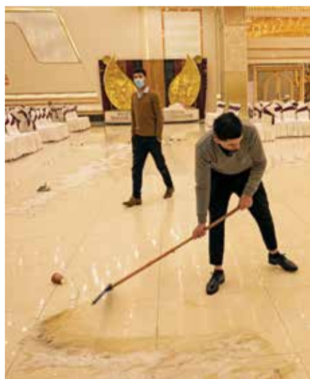
Afghan workers mop a wedding hall at night in Kabul.

As night settles over Afghanistan's capital, only a few small lights and neon signs pierce the darkness and thick blanket of winter pollution. But on some street corners, glittering colossal wedding halls loom out of the gloom, a rare display of opulence in the Afghan capital. The city of more than six million people is often plunged into shadow due to ubiquitous power outages, which only the wealthiest can remedy with expensive generators or solar panels. Apart from a few vendors, the streets are deserted, a stark contrast with the chaotic hustle of the daytime.