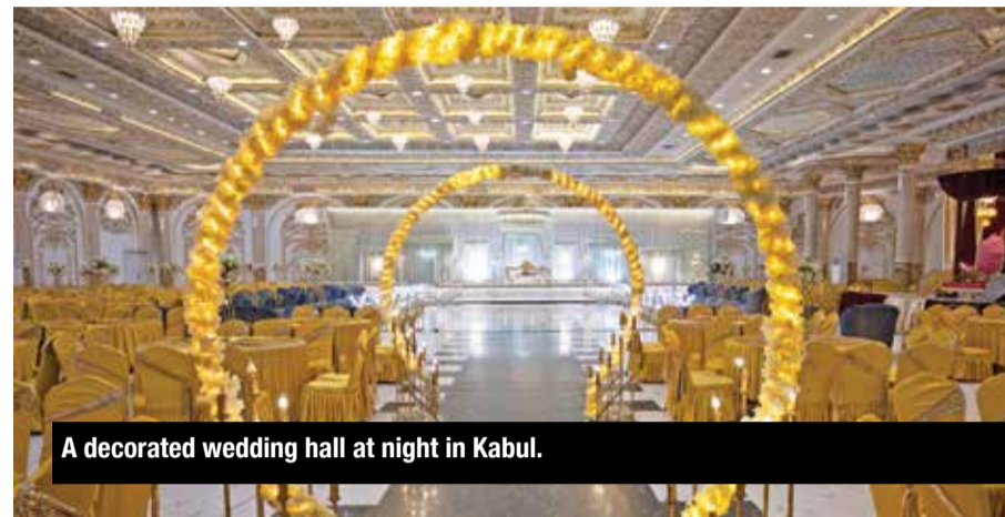
A decorated wedding hall at night in Kabul.