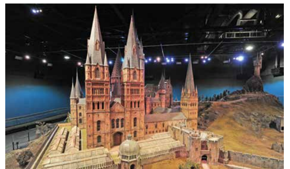
A general view shows a scale model of Hogwarts School of Witchcraft and Wizardry during a preview of the Warner Bros Harry Potter studio tour "The Making of Harry Potter" in north London on March 26, 2012.

In its own statement on Wednesday, Jinjiang International said the new Harry Potter attraction "will lead visitors to embark on a splendid and unsurpassed behind-the-scenes exploration" and share various interactive experiences. The future attraction will be located at an existing amusement park in Shanghai - the Jinjiang Action Park - which closed for renovation work on January 26 and is not expected to reopen until the 2027 launch, the statement said. The site is expected to cover an area of approximately 53,000 square metres, Warner Bros. Discovery said, adding that "the entire visit will take about half a day". - AFP