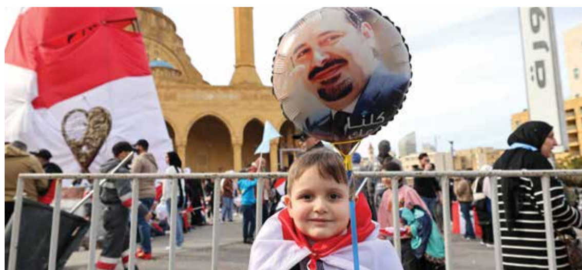
BEIRUT: A young boy holds a balloon bearing a picture of Saad Hariri, former Lebanese prime minister and the son of late premier Rafiq Hariri, during an event marking 20 years since the assassination of his father, in Beirut's Martyrs' Square on February 14, 2025.

The presidency's statement said Aoun had also checked on the deputy commander's condition and emphasized that the incident "cannot be allowed to be repeated". Aoun also "followed up on developments regarding roadblocks, setting fires and riots, and issued directives to the army and security forces to put a stop to these practices", the statement said, adding that the judiciary "has begun investigations on the ground". There was no immediate official comment from Hezbollah. However, the group's ally the Amal movement, led by powerful parliament speaker Nabih Berri, said "the attack on UNIFIL is an attack on south Lebanon" and that "blocking roads anywhere is an assault on civil peace".