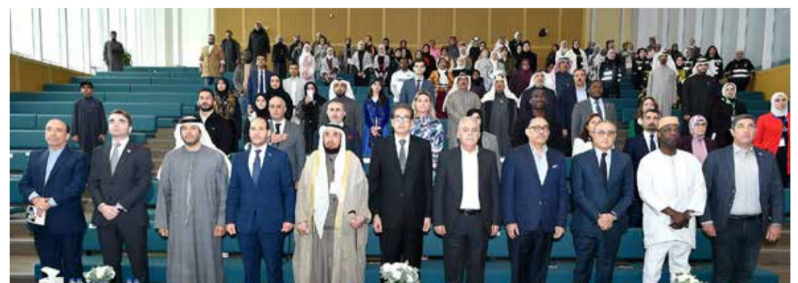
Opening of the UNESCO World Peoples' Day Forum with the participation of 25 countries.

The event witnessed distinguished participation from parents and trainers, which was positively reflected on the performance of the contestants and contributed to their achievement of advanced results in the race. The event was characterized by an atmosphere of joy and interaction, as it concluded with the distribution of awards and medals to the winners in celebration of their achievements and as an incentive to continue active community participation. — KUNA