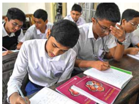
DHAKA: Students study in their classroom at a school in Dhaka.

But Mujib, assassinated in 1975 in a military coup, is also Hasina's father, and his daughter's disgrace and