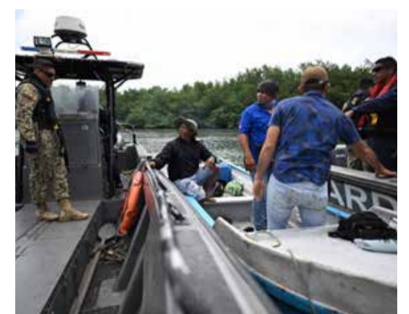
EL ORO: Members of the Ecuadorian armed forces inspect a boat as they patrol the Jambeli Archipelago in the province of El Oro, Ecuador. — AFP

China after being threatened with sanctions and trade tariffs for initially turning away US migrant deportation flights. But his attempts to rally a Latin American coalition opposed to Trump's plans fizzled. "No country wants to be in the middle of an 'us versus them' global geostrategic battle. But when given the option, there's a great alignment of US and Western values," said Marczak. "And so the US investment is preferred." — AFP