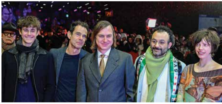
German actor Lars Eidinger (center) and German film director Tom Tykwer (second left) pose for photographers on the red carpet for the opening ceremony and the screening of the film "Das Licht" (The light) in the "Berlinale special" section of the 75th Berlinale, Europe's first major film festival of the year, in Berlin on February 13, 2025.

Haynes said that the world was in a "state of particular crisis" and that filmmakers had witnessed the return of US President Donald Trump "with tremendous concern, shock". Haynes said he hoped the Berlinale, which has a reputation as the most political of the big international film festivals, would serve as a forum for digesting global events. "This festival has always had a strength of conviction and an openness to a challenging and political discourse and bringing that into the filmmaking, and what's happening in the world right now has put an extra urgency to all of that,"