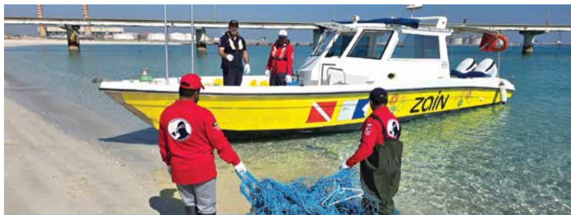
Abandoned fishing nets removed south of Kuwait.

He stated that the team used equipment, boats and cars to pull waste and its removal, adding the team's continuation in cleaning the country's coasts, including Al-Jadilyat and Jahra Reserve was in cooperation with the Environment Public Authority. He also stressed the team's continuation in retrieving boats and fishing nets from coral reefs and its campaigns to raise awareness of the importance of preserving the marine environment through lectures and publications distributed to all segments of society. — KUNA