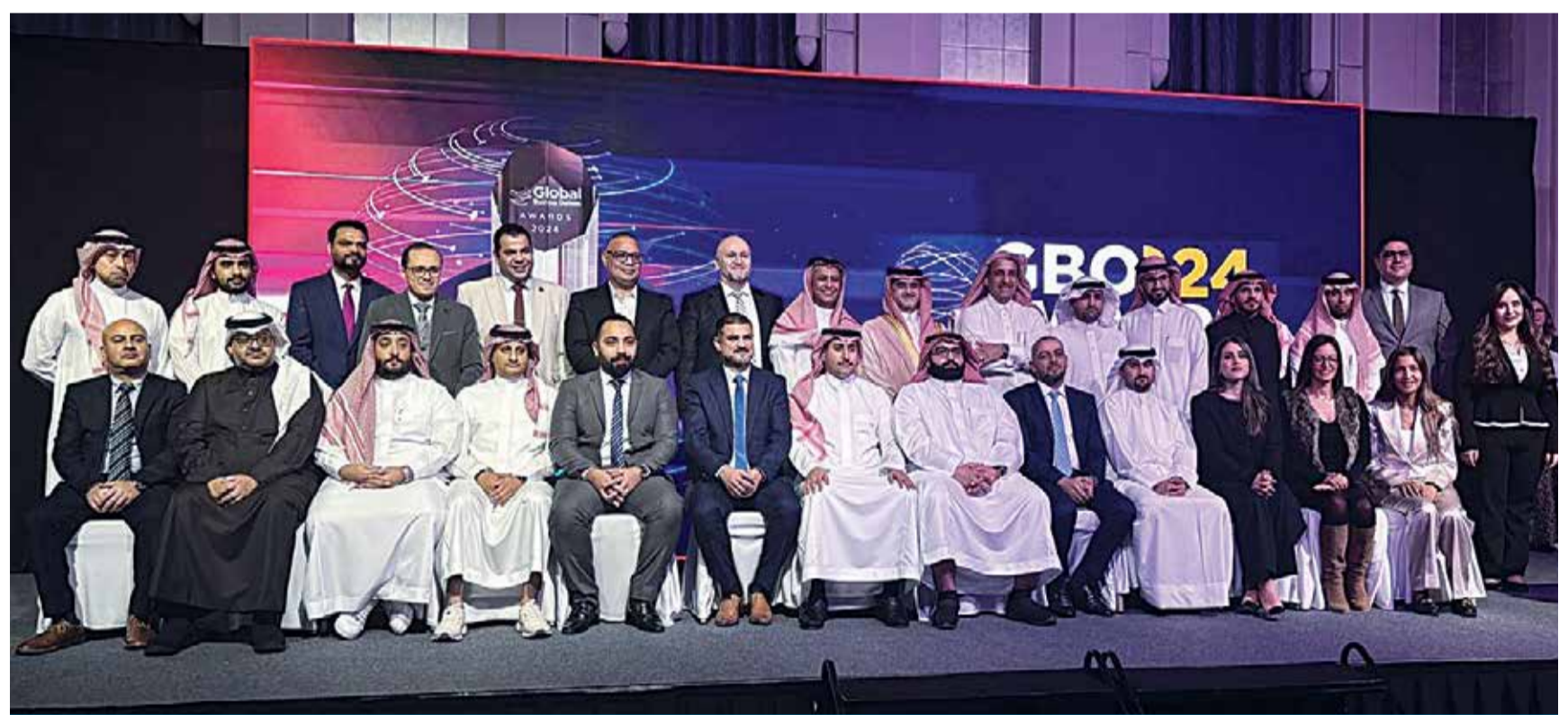
A group photo of the winning companies at the awards ceremony.