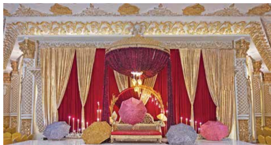
A decorated stage at a wedding hall in Kabul.

creating a fog of pollution in the city slung between mountains 1,800 meters (5,900 feet) above sea level. In the nighttime gloom, wedding halls are "the brightness of the city", said Qaumi. "Here, everyone is very happy." "People come here to meet friends and family, (they) wear new clothes, jewelry... showing off so much," he said of patrons enjoying one of the only places left in Kabul where this is still possible. — AFP