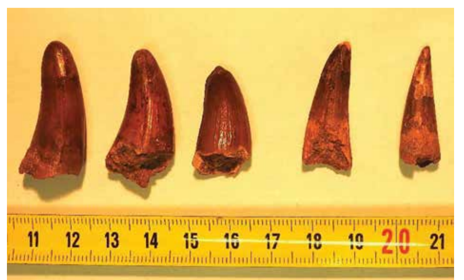
A handout photo made available by the "Brigade des douanes de Menton", DGD1 French Customs on February 14, 2025, shows fossilized dinosaur teeth found by Menton customs officers in two packages being transported by an express freight truck in southern France.

In 2015, customs officers in the French city of Lyon found part of the skeleton of a tarbosaurus bataar, a land dinosaur that walked on its hind legs, that had been illegally excavated in Mongolia. Dinosaur remains have become a hot-ticket item in recent years, with paleontologists voicing concern that museums are losing out to private bidders. A hedge fund CEO last year spent a record $44.6 million to buy a stegosaurus fossil at a New York auction. Dinosaurs first appeared at least 230 million years ago, while the first humans are believed to have appeared on Earth only around six million years ago.