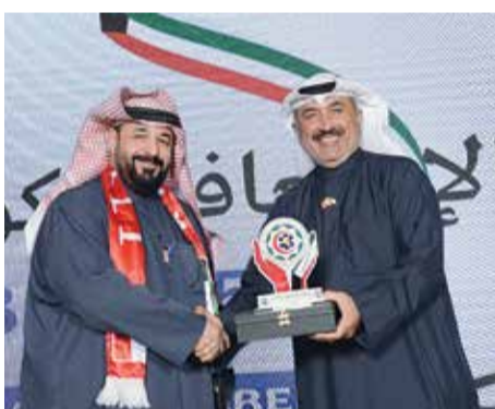
An official being honored.