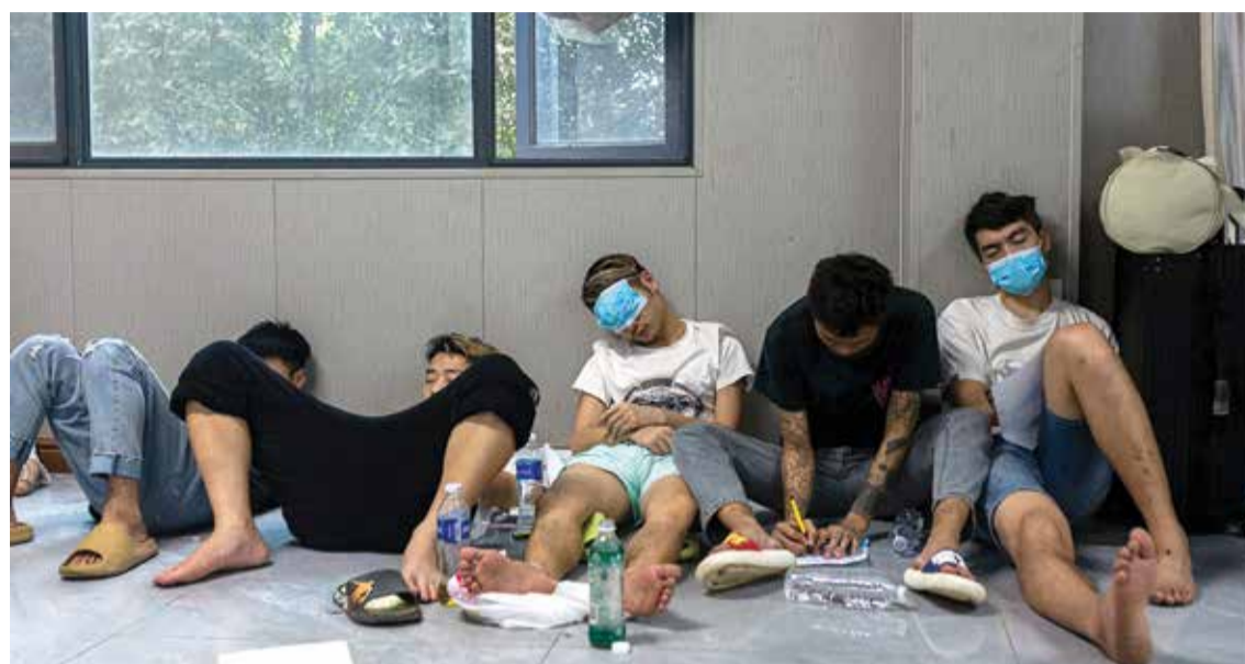
KAYIN STATE: Alleged scam centre workers and victims rest during a crackdown operation by the Karen Border Guard Force (BGF) on illicit activity in Shwe Kokko in Myanmar's eastern Myawaddy township on February 14, 2025.