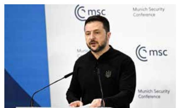
MUNICH: Ukrainian President Volodymyr Zelensky delivers a speech during the 61st Munich Security Conference (MSC) in Munich, southern Germany on February 15, 2025.