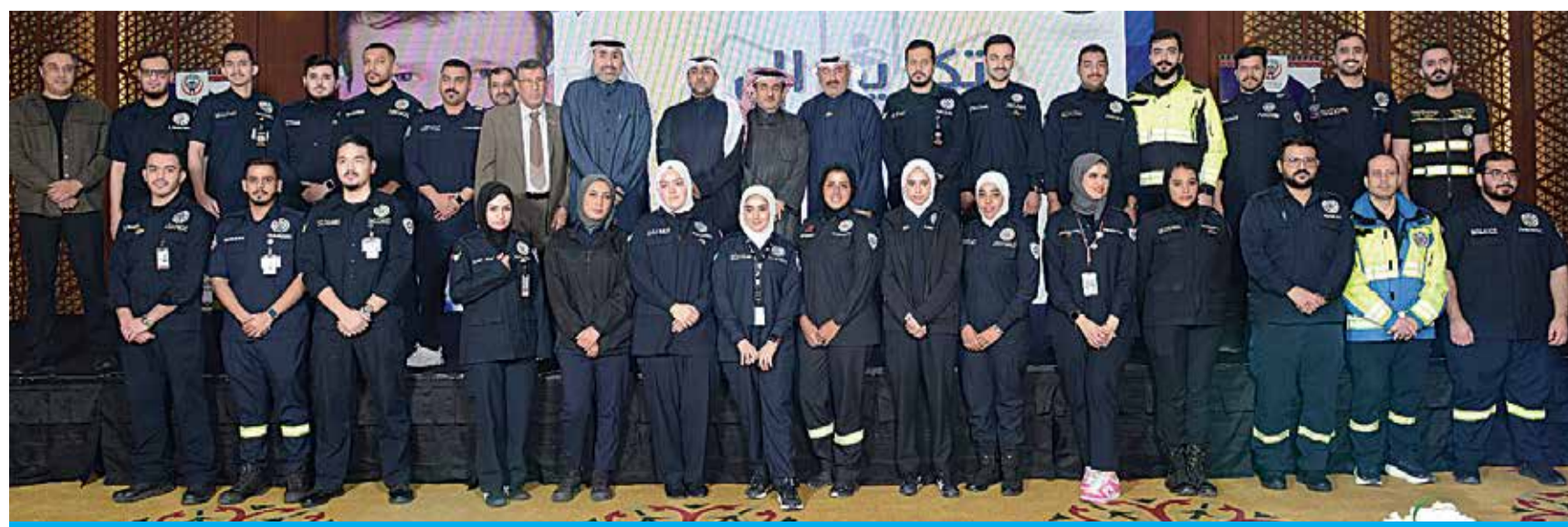
The honorees pose for a group photo.

The department of Relations and Security Media at the ministry said in a press release on Saturday that the traffic, operations and special security sectors participated in the campaign as part of the Ministry of Interior's efforts to control violators and lawbreakers, adding that the results of the campaign resulted in the arrest of 11 residency and labor law violators, 10 vehicles wanted for cases and 10 wanted persons for cases. It pointed out that the campaign also resulted in the arrest of a person without proof of identity and two persons issued (absenteeism) and the referral of a person to the traffic police.