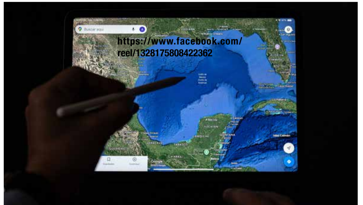
BOGOTA: This photo illustration shows the Gulf of Mexico branded as 'Gulf of America' displayed on the Google Maps application on a tablet in Bogota, Colombia. Google on February 10, 2025 changed the name of the Gulf of Mexico to "Gulf of America" for those using its Maps platform inside the United States, complying with an executive order by President Donald Trump.

Tunisia produces an estimated 140,000 tons of e-waste per year, said Walid Merdassi, a waste management expert. The majority of that - an estimated 80,000 tons per year - is generated by households, which have