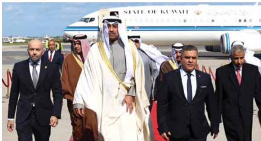
TUNIS: Kuwaiti Defense Minister Sheikh Abdullah Ali Abdullah Al-Sabah arrives in Tunisia to participate in the 42nd session of the Council of Arab Interior Ministers.

The general secretariat of the Arab Interior Ministers said in a statement that the session is scheduled to discuss a number of topics on the agenda, including the report of the Secretary-General of the Council on the work of the General Secretariat between the 41st and 42nd sessions of the Council. Among the most prominent topics on the agenda of the session are the draft of an eleventh phased plan for the Arab strategy to combat the illegal use of narcotics and psychotropic substances, the draft of a seventh phased plan for the Arab strategy for civil