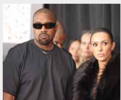
Kanye West (left) and Bianca Censori attend the 67th Annual GRAMMY Awards on February 02, 2025 in Los Angeles, California.