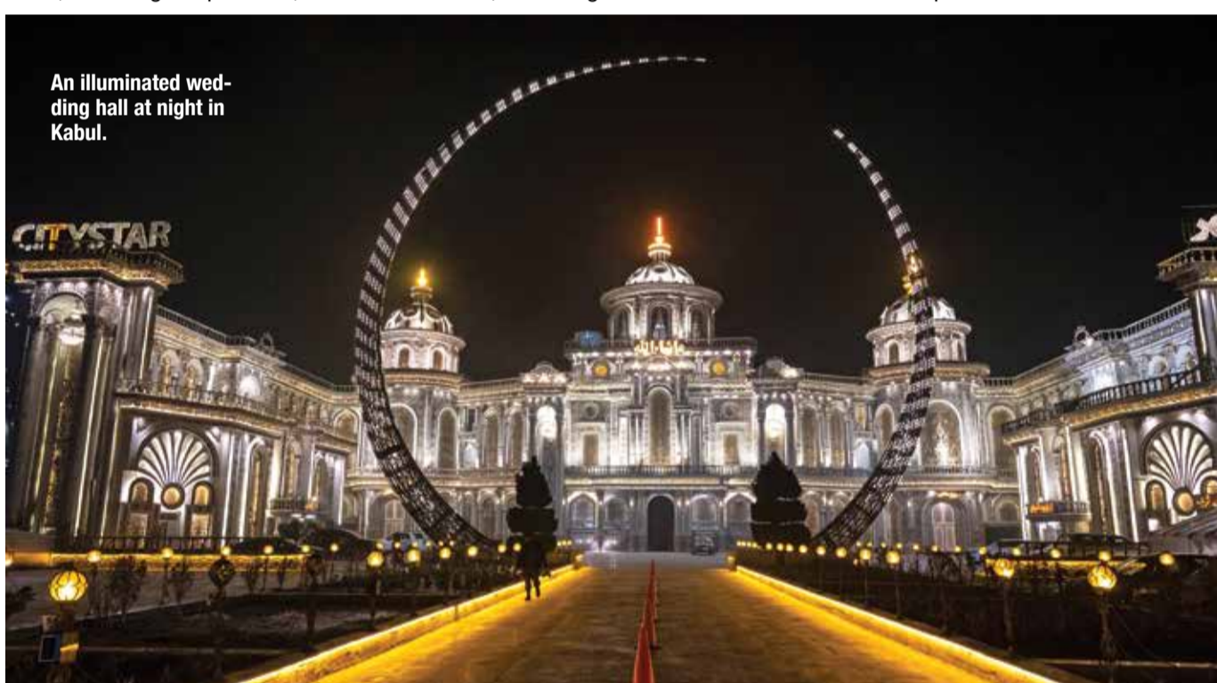
An illuminated wedding hall at night in Kabul.

Power cuts also affect heating, with temperatures easily dropping below 0 degrees Celsius (32 degrees Fahrenheit). Kabul's residents use stoves, burning almost anything from coal and wood to plastic or household waste,