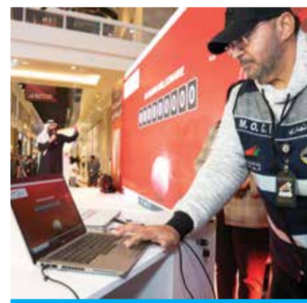
Representative of the Ministry of Commerce and Industry conducts the draw.

As part of Kuwait's National Day celebrations in February, a dedicated wall was placed in the mall for visitors to share their heartfelt wishes for the country.