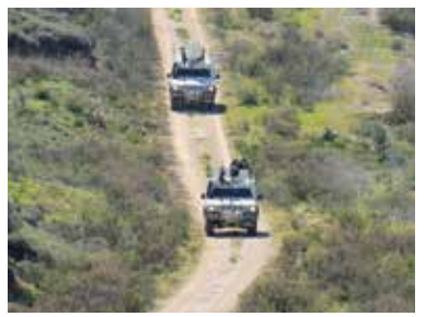
Lebanese leader vows to punish attackers of UN peacekeeper