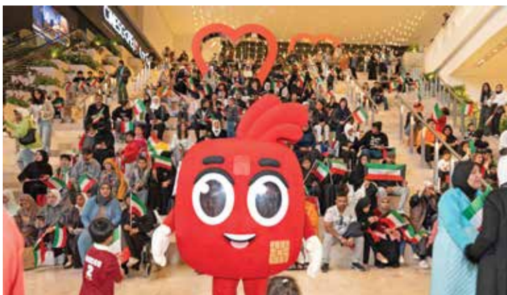
Children enjoy with the Neo Account mascot.