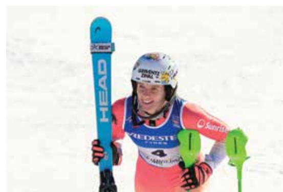
HINTERGLEMM: Winner Switzerland's Camille Rast celebrates after the Women's Slalom event of the Saalbach 2025 FIS Alpine World Ski Championships in Hinterglemm on February 15, 2025.

"While China's performance at the AWG was impressive, it still lags behind global standards in winter sports, with notable gaps