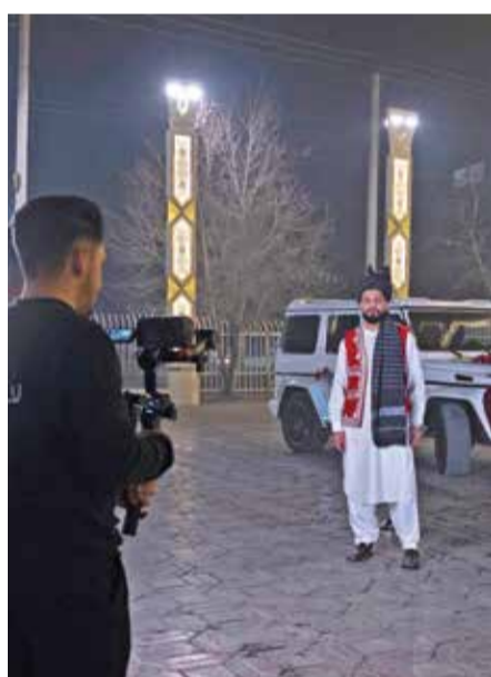
A photographer shoots photos of a groom at a courtyard of a wedding hall at night in Kabul.