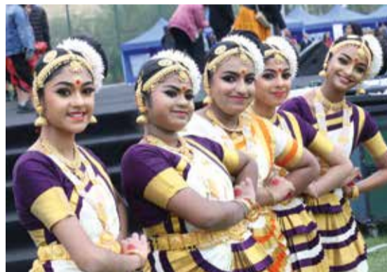
A group of young dancers perform during 'Bharat Mela'.

The event also featured various Indian businesses, reflecting what the ambassador described as "one of the major roles of the embassy," which is to