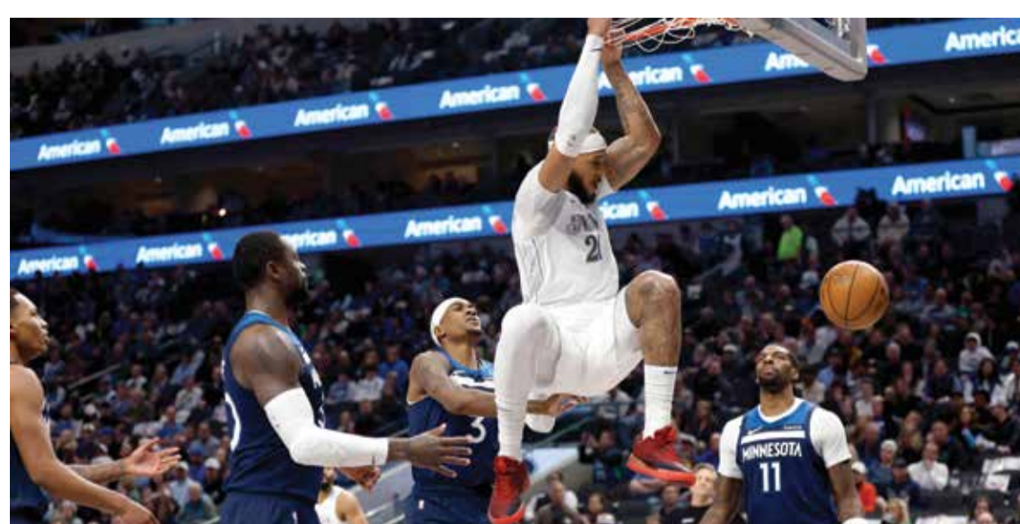
DALLAS: Dallas Mavericks slam dunks against the Minnesota Timberwolves in the first half at American Airlines Center on January 22, 2025 in Dallas, Texas.

"I had a few more points tonight, but it was nothing special." Gilgeous-Alexander received offensive support from Jalen Williams, who chipped in with 25 points, while Cason Wallace added 13 off the bench. John Collins led the Utah scoring with 22 points.