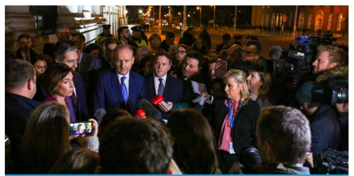
DUBLIN: Ireland's centre-right Fianna Fail party leader Micheal Martin talks to members of the media outside Leinster House, the seat of the Irish Parliament, in Dublin, on January 22, 2025.

"This is the first time, I think, in over 100 years, that the Dail has failed to elect a government to fulfil its constitutional obligation," he added. The appointment of outgoing taoiseach Simon Harris, 38, as deputy prime minister was also delayed. He leads the center-right Fine Gael that came third in the election.