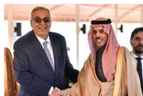
BEIRUT: Lebanon's Foreign Minister Abdallah Bou Habib meets his Saudi counterpart Prince Faisal bin Farhan upon his arrival at Rafic Hariri International Airport on Jan 23, 2025.

He is set to meet Lebanon's newly elected President Joseph Aoun—whose candidacy is widely believed to have been backed by Riyadh and Western