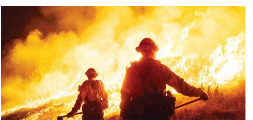
CASTAIC: Firefighters work as the Hughes Fire burns on Jan 22, 2025.

rapidly to cover more than 9,400 acres in just a few hours. The fire was fanned by strong, dry Santa Ana winds racing through the area, pushing a vast pall of smoke and embers ahead of the firefront. Evacuations were ordered for 31,000 people around the lake, which sits 56 km north of Los Angeles, and close to the city of Santa Clarita. "I'm just praying that our house doesn't burn down," one man told broadcaster KTLA as he packed his car. The Hughes Fire came as the greater Los Angeles area was on edge after two enormous fires tore