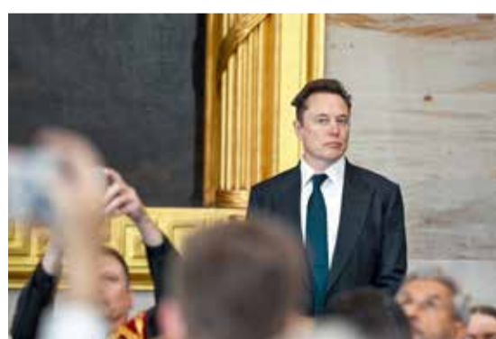
WASHINGTON: Tesla and SpaceX CEO Elon Musk attends the inauguration ceremony where Donald Trump will be sworn in as the 47th US President in the US Capitol Rotunda in Washington, DC, on January 20, 2025.

"Wrong, as you surely know. Want to come visit