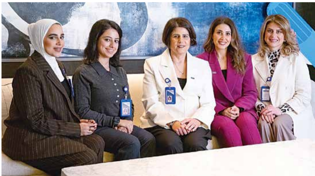
NBK team at the event.

To date, the total amount of Kuwaiti aid sent to Syria has reached about 280 tons, including food, medical supplies, and winter necessities aimed at helping the most vulnerable groups in Syria under the "Kuwait by Your Side" campaign, with the participation of various Kuwaiti charity organizations. — KUNA