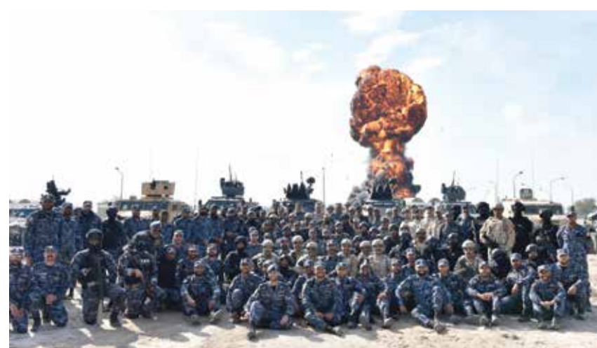
Ministry of Interior and military personnel pose for a photo in front of their vehicles during the joint exercise on Failaka Island.