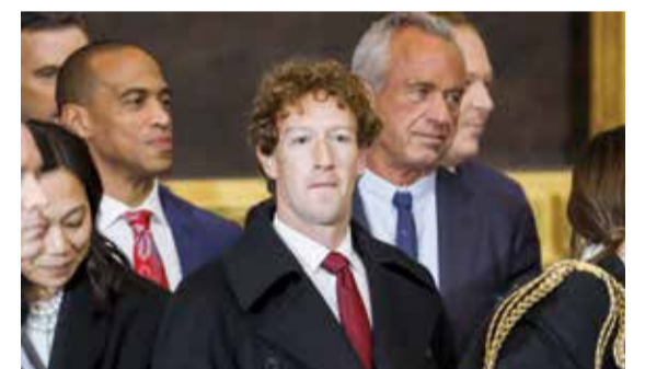
WASHINGTON: Mark Zuckerberg (C), CEO of Meta, attends the inauguration ceremony where Donald Trump will be sworn in as the 47th US President in the US Capitol Rotunda in Washington, DC, on January 20, 2025.

Zuckerberg, who attended Trump's inauguration ceremony Monday, has dined with the new president, named several of his allies to key roles and ended programs targeted by conservatives, including shutting off Meta's fact-checking efforts in the US.