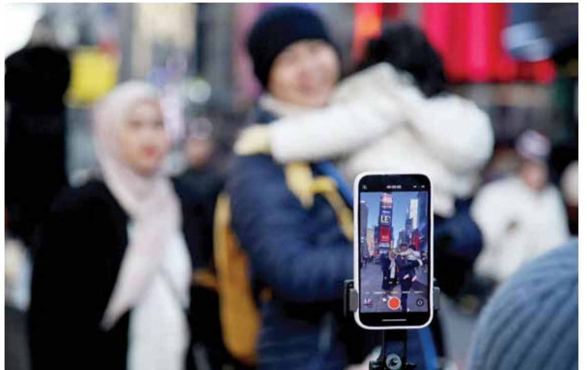
NEW YORK: People record themselves on a smartphone for social media in Times Square in New York City on January 17, 2025.

While Instagram is considered the most likely alternative to TikTok, Chinese application named