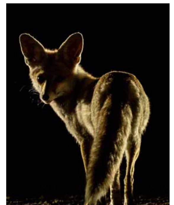
KUWAIT: The Arabian red fox, the largest species of fox native to the Arabian Peninsula, is well documented by the Environment Public Authority.

common wild animals in the Arabian Peninsula. It is found in Kuwait, Oman, the UAE, Syria, Jordan, Yemen, and Saudi Arabia.