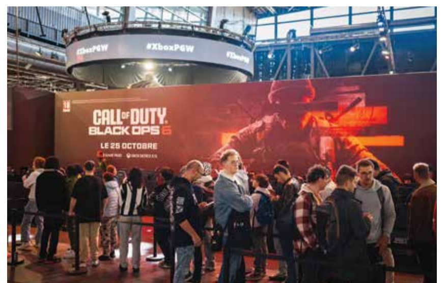
PARIS: Visitors wait in line to play the "Call of Duty: Black Ops 6" first-person shooter game co-developed by "Treyarch and Raven Software" and published by "Activision" during the Paris Games Week fair in Paris, on October 23, 2024.

The PS5 remained the top-selling console in the US, followed by Nintendo's Switch. Japan-based Nintendo announced last week that its follow-up, the hotly anticipated Switch 2, would arrive sometime this year. Spending on mobile games totaled al-