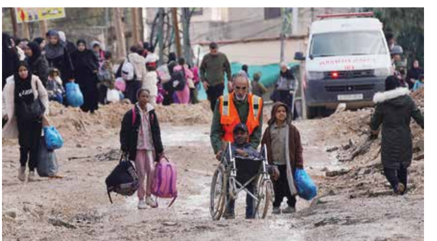
JENIN: People carrying their belongings use a street previously destroyed by Zionist forces as they flee the Jenin refugee camp in the occupied West Bank on Jan 23, 2025.