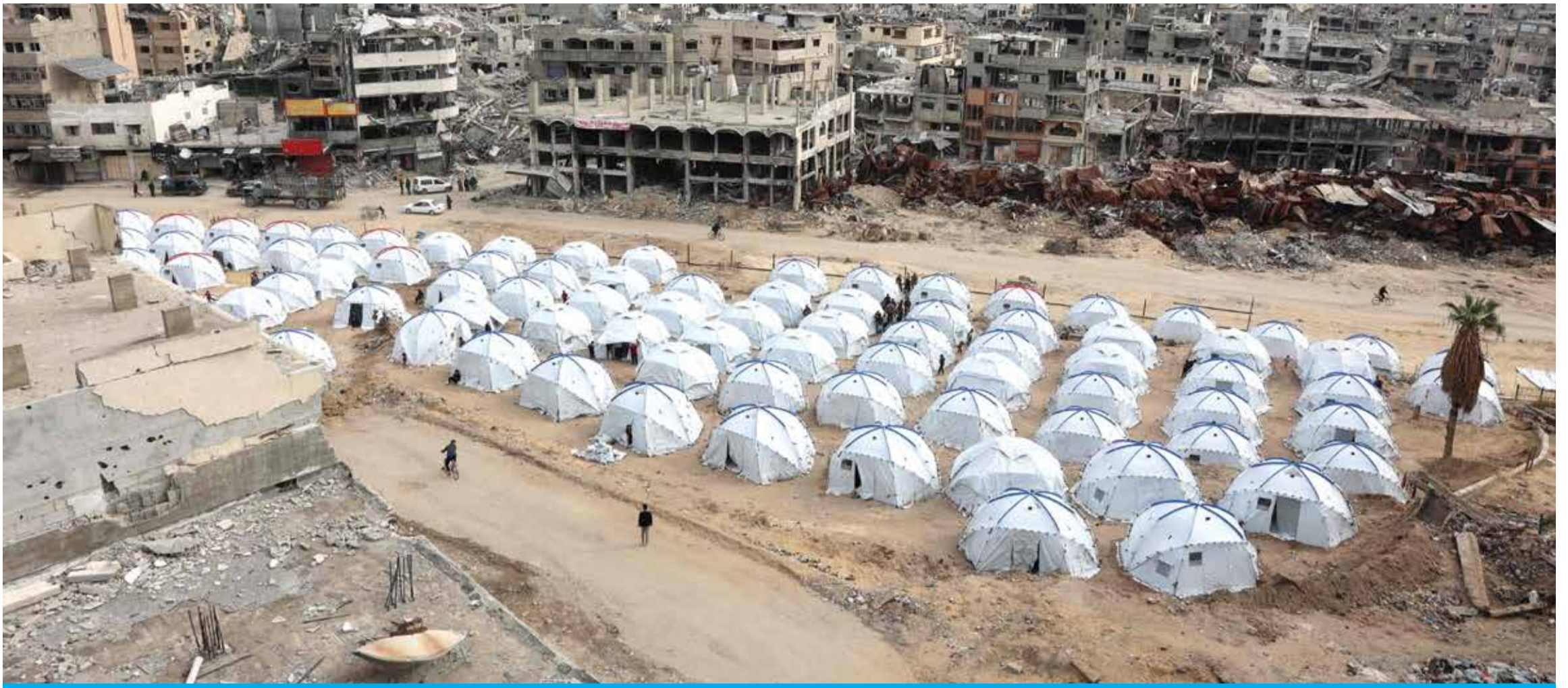
GAZA: Newly erected tents are spread out in the Shujaia neighborhood in Gaza City on Jan 22, 2025, as displaced Palestinians return to the city on the fourth day of a ceasefire deal.