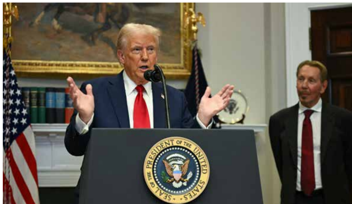
WASHINGTON: Larry Ellison, Executive Chairman Oracle listens as US President Donald Trump speaks in the Roosevelt Room at the White House on January 21, 2025, in Washington, DC.

World Trade Organization chief Ngozi Okonjo-Iweala called on cooler heads to prevail during a WEF panel discussion on tariffs on Thursday, warning that tit-for-tat levies would be "catastrophic" for the world economy. "Please let's not hyperventilate," she quipped. "I know we are here to discuss tariffs. I've been saying to everybody: Could we chill, also?"