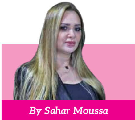
By Sahar Moussa

Kuwaiti artist Mohammed Al-Mohanna's unique artistic style celebrates tradition while embracing modern creativity