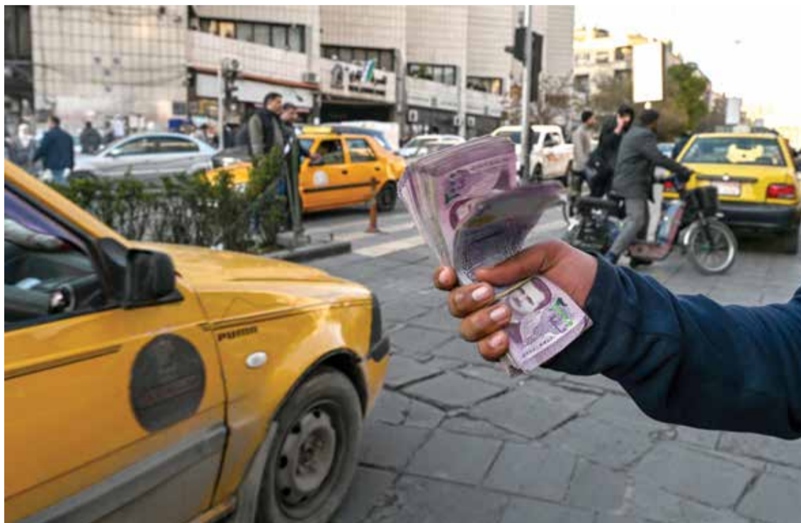
DAMASCUS: A currency trader offers Syrian liras for exchange on a street in Damascus on January 14, 2025.

Assad's government kept a firm grip on foreign currency dealings as a way to control the economy,