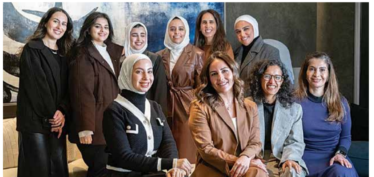
Creative Confidence team