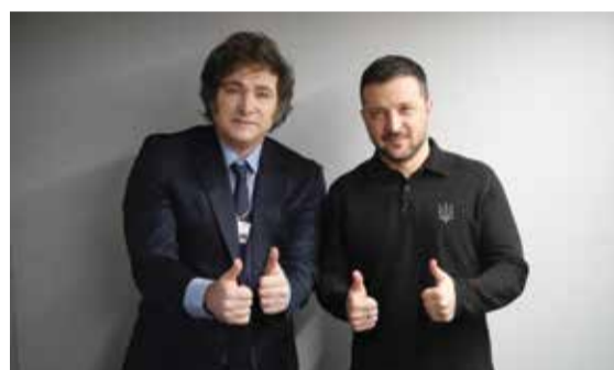
DAVOS: Argentina's President Javier Milei (left) poses for a picture with Ukrainian President Volodymyr Zelensky prior to their meeting on the sideline of the World Economic Forum (WEF) annual meeting in Davos, Switzerland on January 22, 2025.