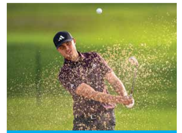
LA JOLLA, CALIFORNIA: Ludvig Aberg of Sweden hits out of a greenside bunker on the 10th hole during the first round of the Farmers Insurance Open 2025 at Torrey Pines North Course on January 22, 2025 in La Jolla, California.