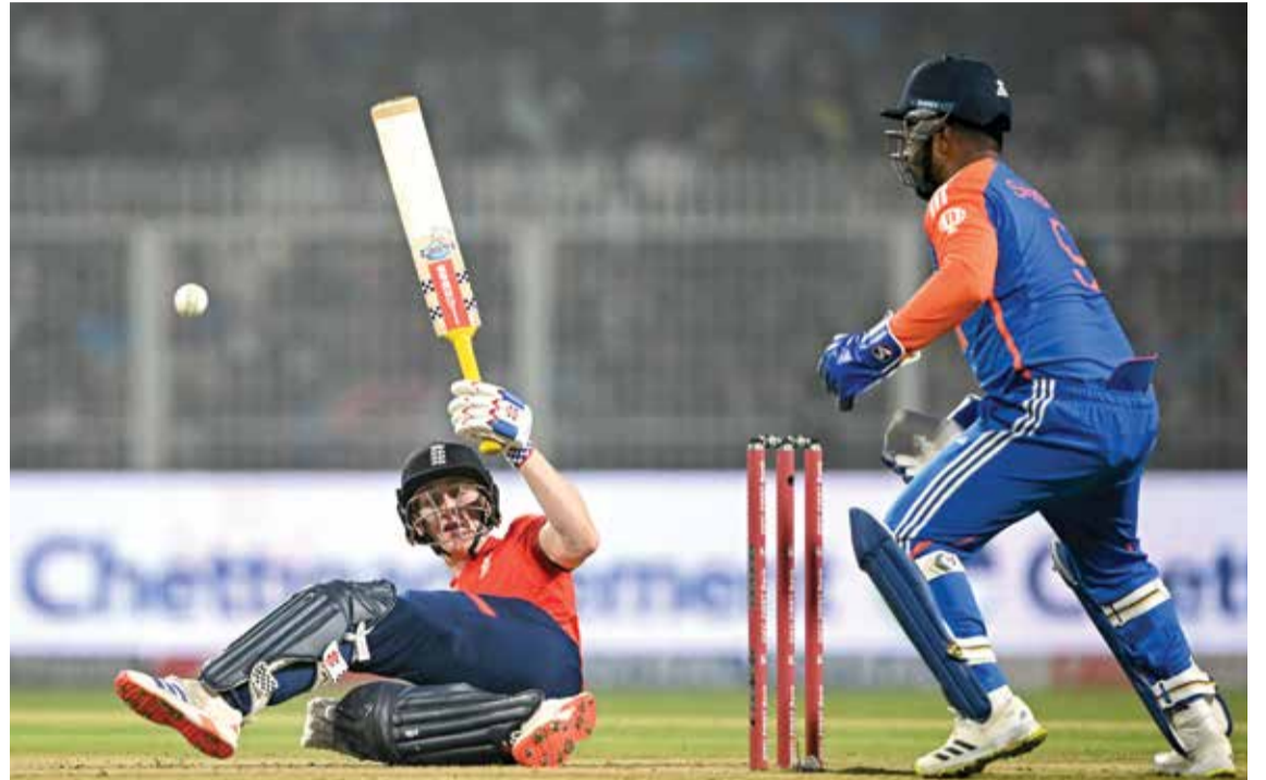
KOLKATA: England's Harry Brook (L) falls while playing a shot as India's wicketkeeper Sanju Samson watches during the first Twenty20 international cricket match between India and England at the Eden Gardens in Kolkata on January 22, 2025.

India surprisingly left out Mohammed Shami after the fast bowler returned to the squad following a heel injury that kept him away from competitive cricket for over a year. The second T20 is on Saturday in Chennai.