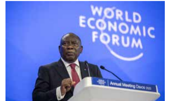
SWITZERLAND: South Africa's President Cyril Ramaphosa looks over as he gives an address during the World Economic Forum (WEF) annual meeting in Davos on January 21, 2025.