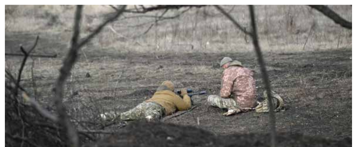
KYIV: Soldiers of the 59th brigade of Ukrainian Armed Forces conduct a sniper training at an undisclosed location in the Donetsk region, on January 22, 2025, amid the Russian invasion of Ukraine.

In alignment with Kuwait Vision 2035, "New Kuwait," and its commitment to fostering collaborative partnerships, Gulf Bank is dedicated to driving robust sustainability initiatives across environmental, social, and governance (ESG) dimensions. The bank is committed to implementing strategically selected and diverse sustainability programs both internally and externally.