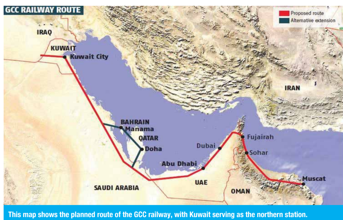
This map shows the planned route of the GCC railway, with Kuwait serving as the northern station.

Kuwait's Cabinet has tasked the Public Authority for Roads and Transport with expediting the work on the railway project, aiming for completion ahead of the scheduled deadline. The authority has been directed to streamline the documentation process, accelerate the project's implementation phases, and provide semi-annual progress reports to the Cabinet. This railway project, which has been in development since at least 2014, is expected to deliver strategic and economic benefits to Kuwait as part of the GCC's unified transportation network.