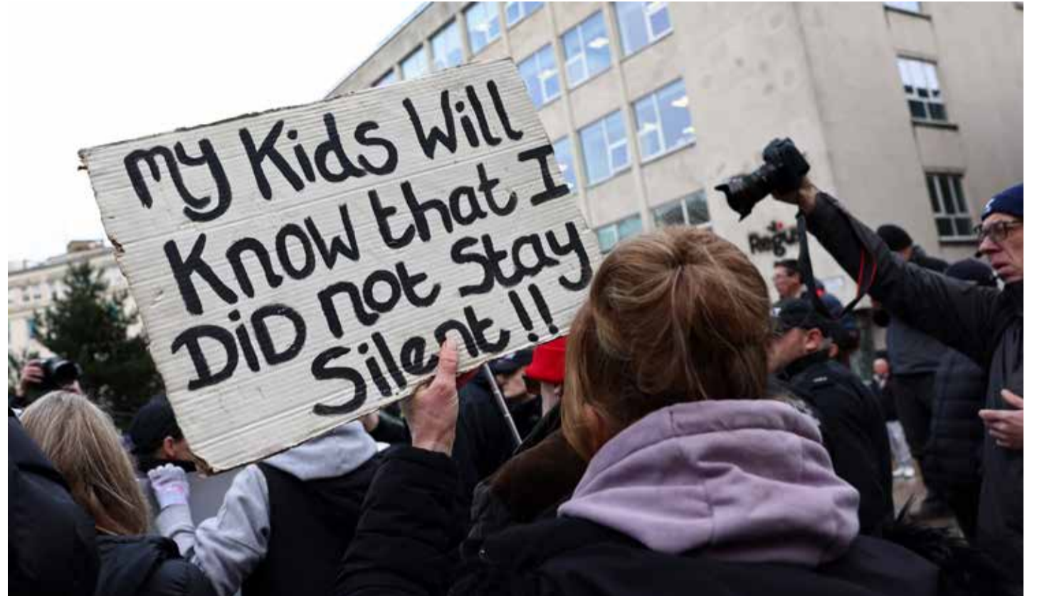
LIVERPOOL: Protestors hold placards as they demonstrate in front of members of the media outside of The Queen Elizabeth II Law Courts in Liverpool, north west England ahead of sentencing Southport attacker Axel Rudakubana.

"I want to be crystal clear in front of the British people today. We will leave no stone unturned ... Nothing will be off the table in this inquiry. It will lead to change," Starmer told a press conference. The main opposition