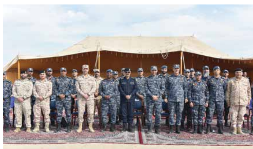
KUWAIT: Major General Sheikh Salem Al-Nawaf Al-Ahmad Al-Sabah poses for a photo with officials participating in the training on Failaka Island.

The exercise involved live ammunition, explosives, and simulation scenarios designed to address potential security challenges. Participating from the Ministry of Interior were the Special Security Forces Sector, including the General Department of Special Security Forces, the Security Armor Department, the Explosive Ordnance Disposal Department, the Special Units Department, and the Security and Control Department. The Kuwaiti Army's 94th Armored Bri-