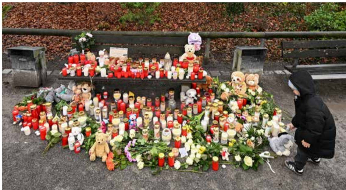
ASCHAFFENBURG: A child visits a makeshift memorial of candles, flowers and soft toys for the victims of a knife attack, on January 23, 2025 in Aschaffenburg, western Germany.