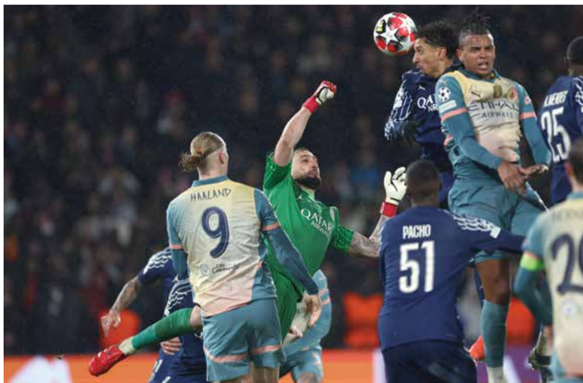
PARIS: Paris Saint-Germain's Italian goalkeeper #01 Gianluigi Donnarumma (C) boxes the ball during the UEFA Champions League, league phase football match between Paris Saint-Germain and Manchester City at the Parc des Princes Stadium in Paris.

"We should absolutely have five points more