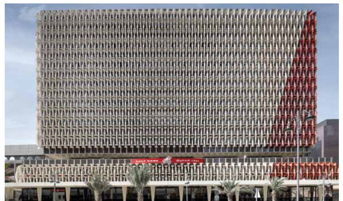
Gulf Bank's headquarters.

"I hope that by, before next winter we will add already 60 megawatts of capacity with this program," with full capacity of 500 megawatts at Tylygul'ska reached by the end of 2026. That would be enough to supply around 900,000 homes, he said.