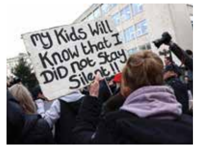
Tears, gasps as UK court hears horrific details of stabbing spree