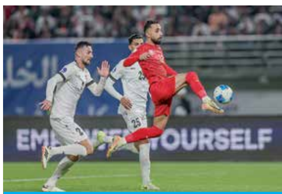
KUWAIT: Bahraini and Iraqi players fight for the ball.