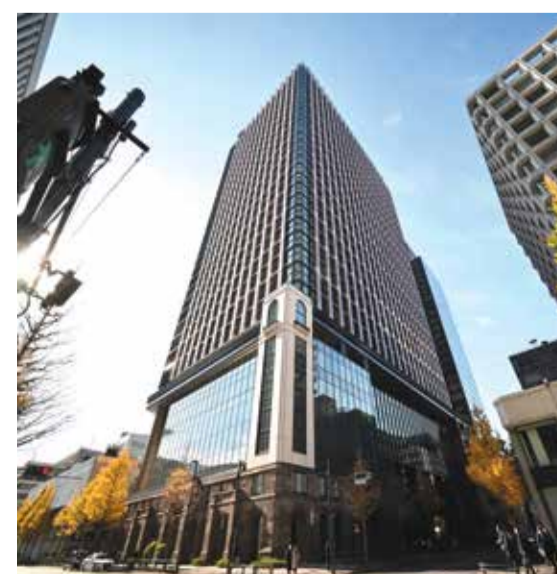
TOKYO: This picture shows an office building (center) where Nippon Steel's head office is located in Tokyo on December 19, 2023.

Japan Prime Minister Shigeru Ishiba urged Biden to approve the merger to avoid marring recent efforts to strengthen ties between the countries, Reuters reported in November. Nippon also said on Thursday the review process of the antitrust division of the US Department of Justice was also underway, without specifying when it may end. Despite the opposition, US Steel shareholders overwhelmingly voted in April to approve the acquisition. The two companies have also worked to assuage concerns over the combination. Nippon has offered to move its US headquarters to Pittsburgh, where the US steelmaker is based and promised to honor all agreements in place between US Steel and USW. — Reuters