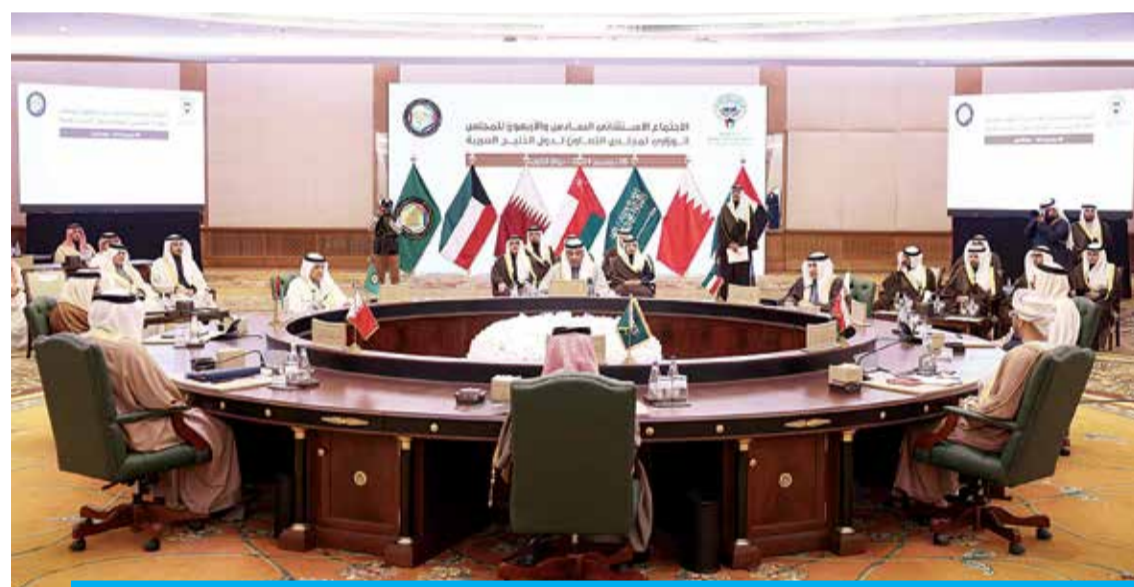
KUWAIT: Foreign Ministers of GCC countries convene for the 46th extraordinary meeting of the GCC Ministerial Council.