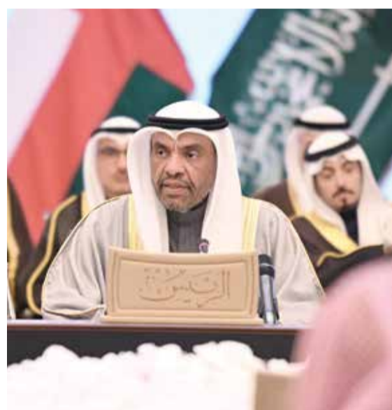
Kuwait's Minister of Foreign Affairs Abdullah Al-Yahya