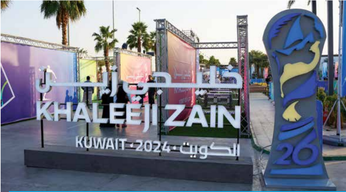
Zain's fan zones welcome fans throughout the tournament.

Live match broadcasts, competitions & prizes, daily activities and more across 5 locations