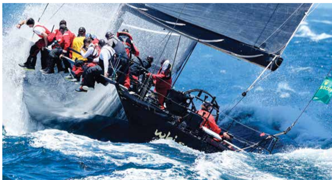
SYDNEY: This handout image taken and received from Rolex on December 26, 2024 shows the yacht Whisper competing at the start of the annual Sydney to Hobart yacht race on Boxing Day on Sydney Harbor.

Six men died, five boats sank and 55 sailors were