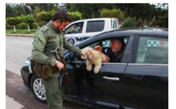
LATAKIA: A fighter affiliated with Syria's new administration pets a man's dog at a checkpoint in this coastal city on Dec 26, 2024.