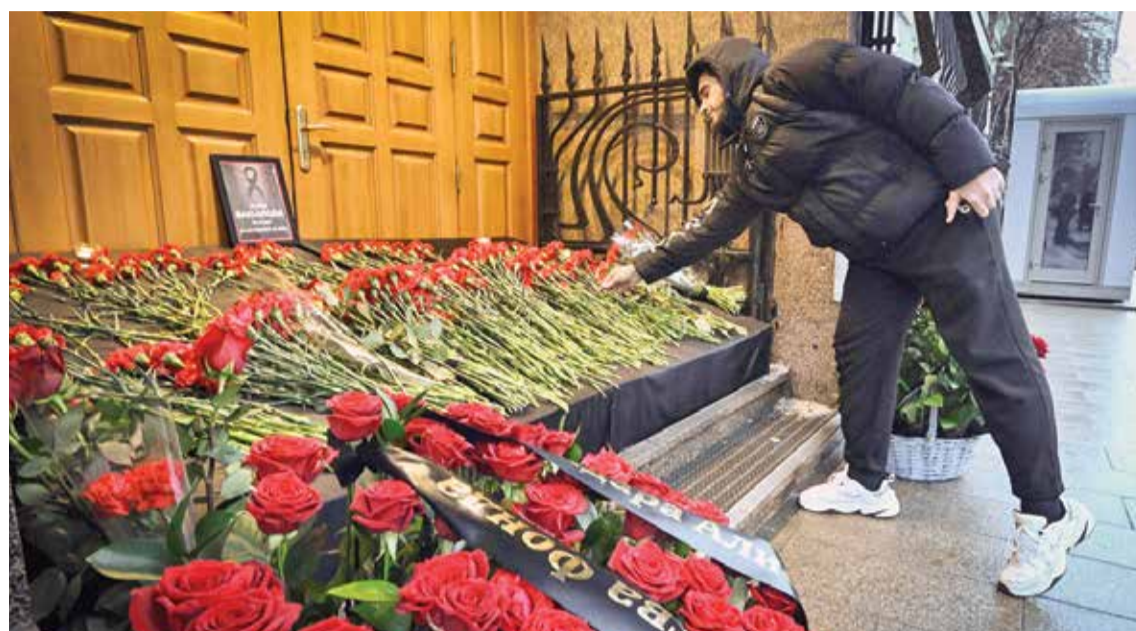
A man lays flowers to Azerbaijan's Embassy in Moscow on December 26, 2024 paying tribute to the victims of Azerbaijan Airlines' plane crash.

"It would be wrong to make any hypotheses before the investigation's conclusions," Kremlin spokesman Dmitry Peskov told reporters. The Embraer 190 aircraft was supposed to fly northwest