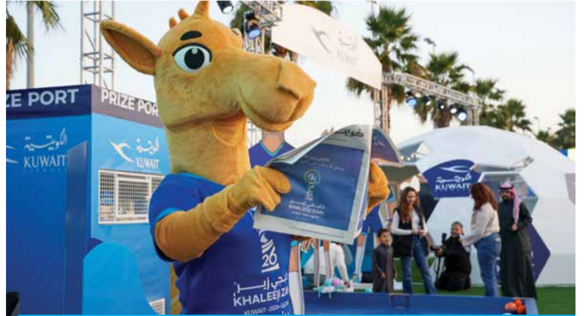
The tournament mascot, Haydo.

KUWAIT: Since the first whistle blew to mark the start of Khaleeji Zain 26, Zain, the Title Partner of the tournament, has been committed to enriching the fans' experience both inside and outside the stadium. Through dedicated fan zones spread across Kuwait, Zain celebrates this regional sporting event throughout the tournament's duration.