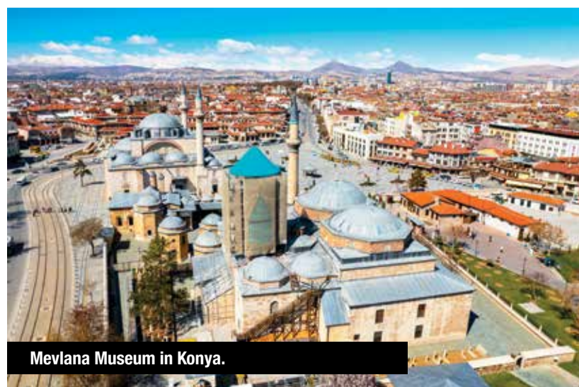
Mevlana Museum in Konya.