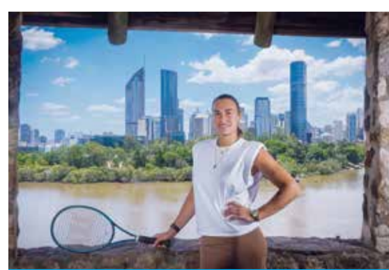
BRISBANE: Belarus' Aryna Sabalenka poses during a media conference ahead of the Brisbane International tennis tournament at Kangaroo Point Cliffs in Brisbane.

Sabalenka also began 2024 in Brisbane, reaching the final without losing a set only to crash to Kazakhstan's Elena Rybakina in the decider. She spent time in the off-season at her home in Florida before heading to the Middle East to prepare for Australia