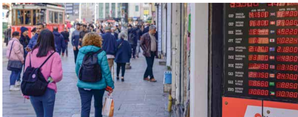
ANKARA: Foreign exchange rates are displayed against the Turkish lira in this photo.

The central bank now expects inflation to reach 44 percent at the end of 2024, up from a previous estimate in August of 38 percent. The bank said the level of the policy rate would be determined in a way to ensure the tightness required by the pro-