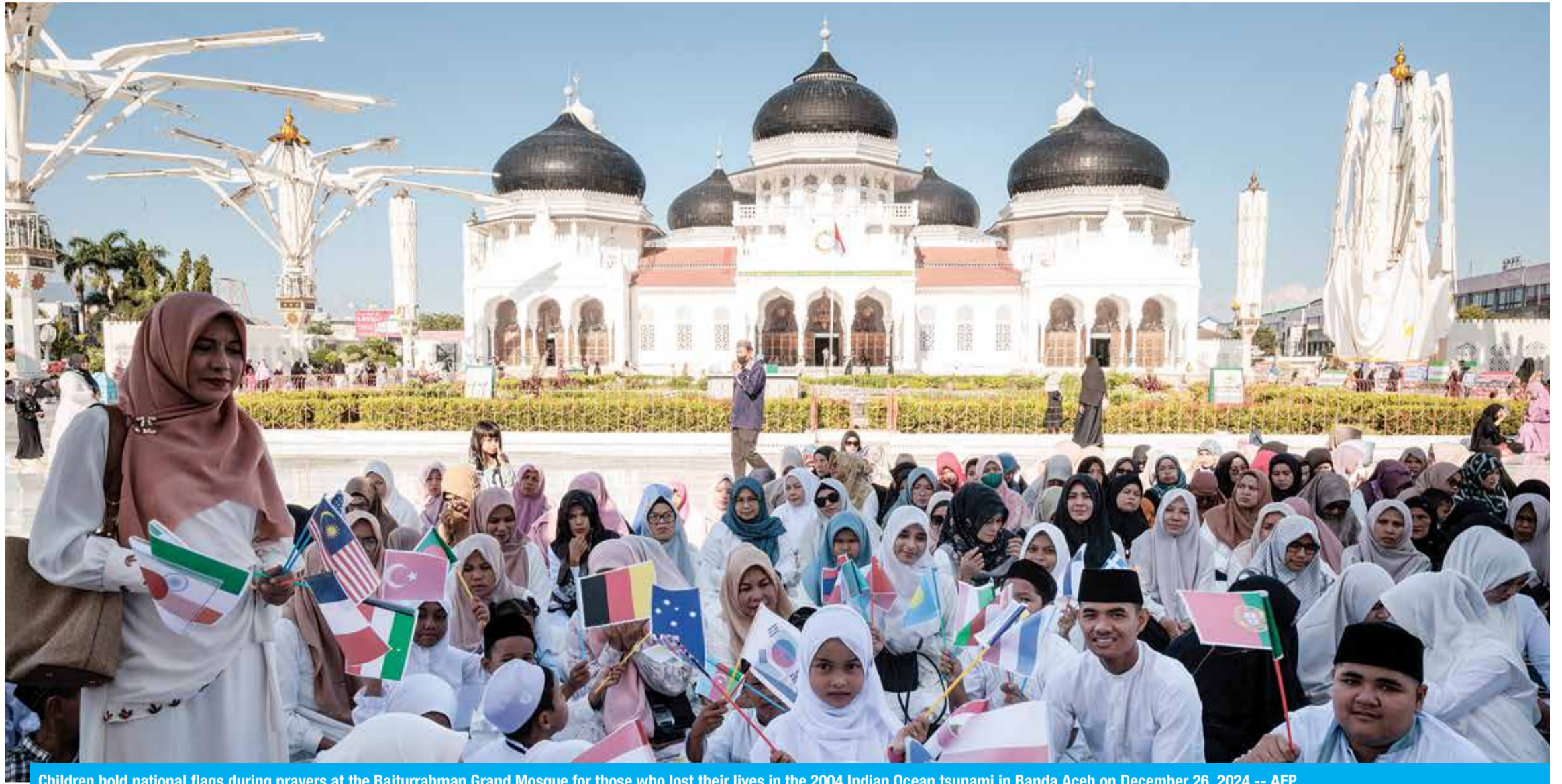
Children hold national flags during prayers at the Baiturrahman Grand Mosque for those who lost their lives in the 2004 Indian Ocean tsunami in Banda Aceh on December 26, 2024.