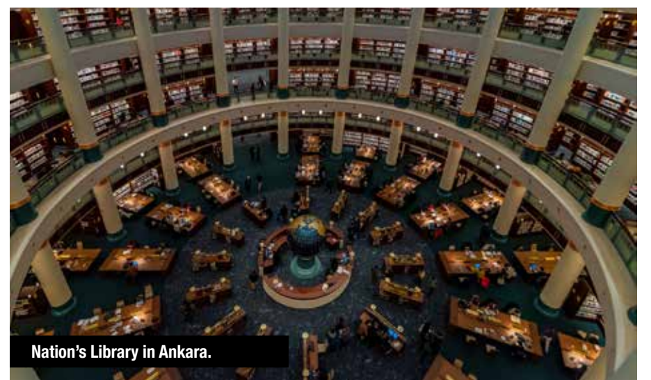
Nation's Library in Ankara.