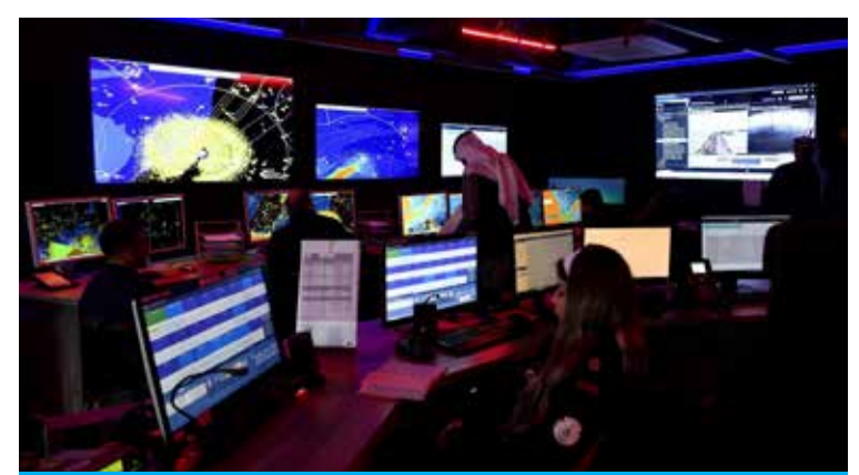
KUWAIT: Coast Guard personnel perform their work at the Sabah Al-Ahmad Naval Base.