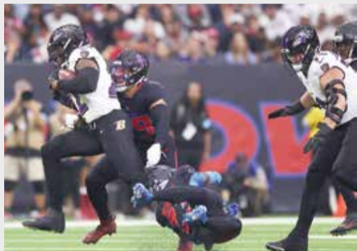
HOUSTON: Derrick Henry #22 of the Baltimore Ravens avoids a tackle from Eric Murray #23 of the Houston Texans during the first quarter at NRG Stadium in Houston, Texas.

Tyres Maxey scored 33 points and made 12 assists with his 13 points in the fourth quarter crucial as Philadelphia, who had led by 16 at the break, recovered from Boston's third quarter rally. Jayson Tatum top scored for the Celtics with 32 points and also grabbed 15 rebounds.