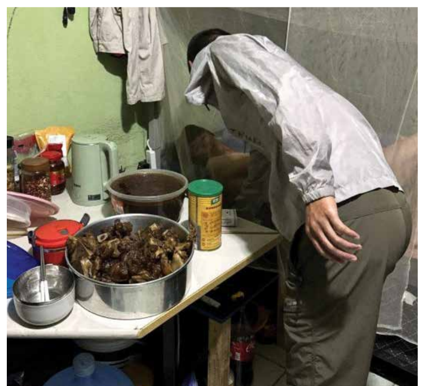
This handout picture released by Brazil's Workers Public Ministry (MPT) shows an operation that rescued 163 workers from "slave-like conditions" in Camacari, Bahia state, Brazil on December 24, 2024.