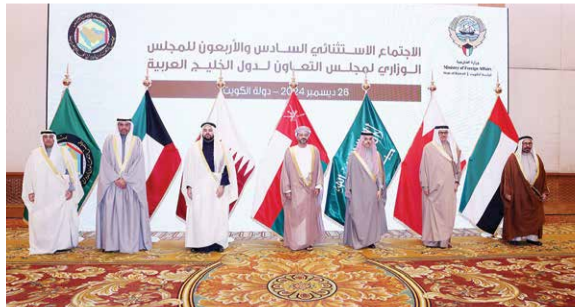
KUWAIT: Gulf Cooperation Council chief and foreign ministers pose for a picture after a meeting on Dec 26, 2024.

KUWAIT: Kuwaiti Foreign Minister Abdullah Al-Yahya, during the 46th GCC Ministerial Council meeting in Kuwait, reaffirmed support for Syria's sovereignty and independence while opposing external interference. The GCC called for a political solution to the Syrian crisis, emphasizing refugee returns, militia disarmament and preserving state institutions. GCC Secretary-General Jassem Al-Budaiwi stressed reconciliation and stability as priorities, condemning Zionist actions in Syria, including in the Golan Heights. The council also addressed Lebanon's instability, highlighting the importance of its Jan 2025 presidential elections and adherence to UN Resolution 1701. Reaffirming commitment to the Palestinian cause, the GCC condemned Zionist violations and advocated for a two-state solution based on 1967 borders with East Jerusalem as the capital. (See Page 3)