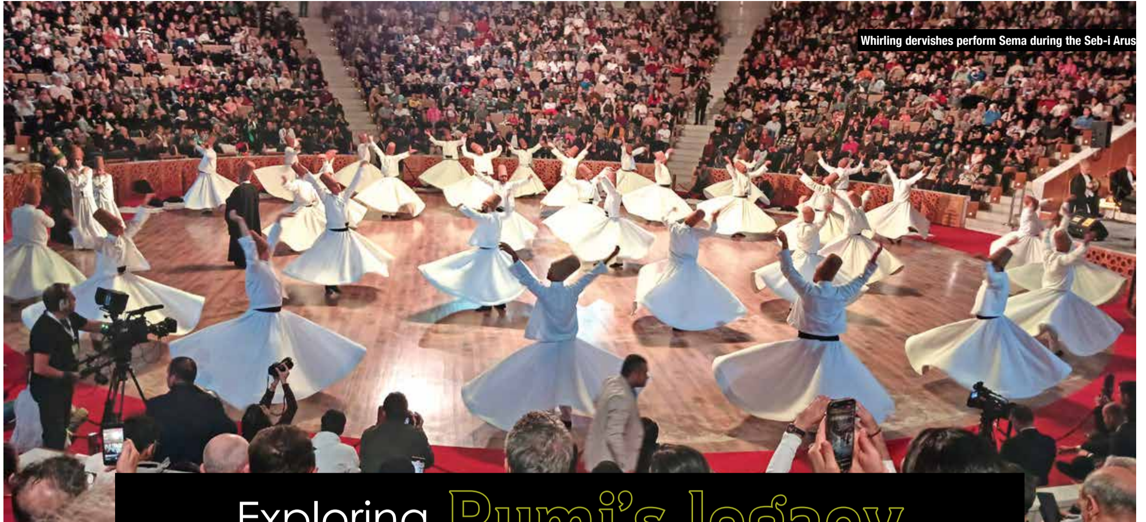
Whirling dervishes perform Sema during the Seb-i Arus