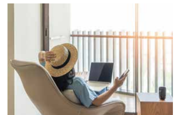
Being away from the workplace, and even in a new location, is often not enough to detach psychologically.