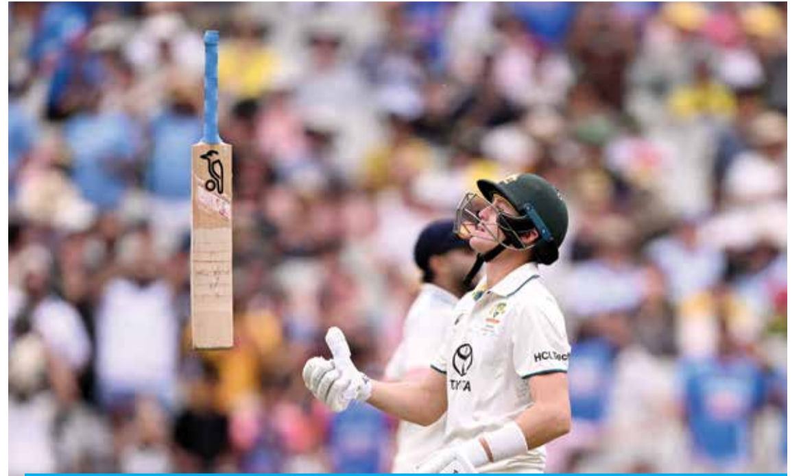
MELBOURNE: Australian batsman Marnus Labuschagne throws his bat in the air after his dismissal on the first day of the fourth cricket Test match between Australia and India at the Melbourne Cricket Ground (MCG) in Melbourne on December 26, 2024.

Meanwhile, Cricket's governing body fined In-