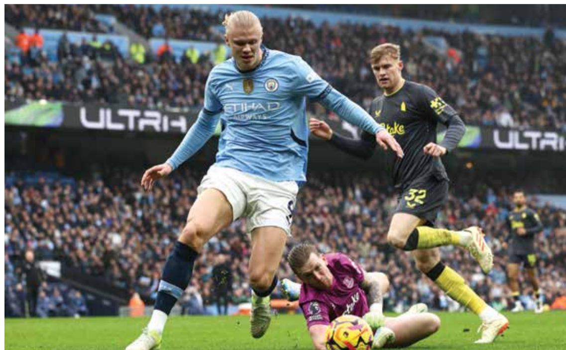
MANCHESTER: Manchester City's Norwegian striker #09 Erling Haaland (L) takes the ball past Everton's English goalkeeper #01 Jordan Pickford (C) during the English Premier League football match between Manchester City and Everton at the Etihad Stadium in Manchester, north west England, on December 26, 2024.

Villa's Jhon Duran was sent off in the 32nd min-