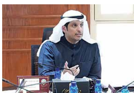
KUWAIT: Minister Abdulrahman Al-Mutairi meets with officials to discuss preparations for Kuwait's plans to mark its designation as the Capital of Arab Culture and Media 2025.

Al-Mutairi emphasized the importance of collaboration among all stakeholders to ensure the success of this significant project, which offers a unique opportunity to showcase Kuwait's rich cultural and media heritage. He highlighted that the event marks a continuation of Kuwait's leadership in fostering creativity, dialogue, and cultural exchange, with strong