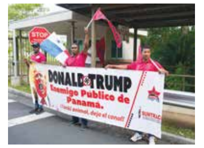
Trump wishes 'Merry Christmas' to 'left lunatics' in frenzy of posts