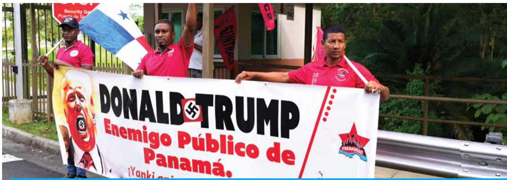
Demonstrators hold a banner that reads "Donald Trump, public enemy of Panama," during a protest outside the US embassy in Panama City on December 24, 2024.

The Republican's comeback electoral win in November came on the back of heightened political polarization and division across the country, which Trump leaned into in his posts. Trump posted a photo showing himself as "patriot of the year," and another smirking at former president Barack Obama, a Democrat. Others included articles praising his cabinet picks, his wish to purchase Greenland and his complaints about fees paid by US ships