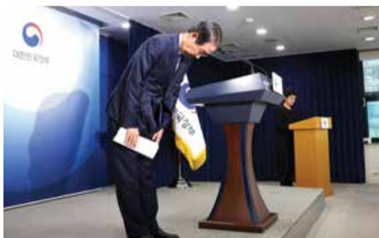
South Korea Prime Minister and acting President Han Duck-soo bows as he delivers his address to the nation at the Government Complex in Seoul on December 26, 2024.

"The consistent principle embedded in our constitution and laws is to refrain from exercising significant exclusive presidential powers, including the appointment of constitutional institutions," Han argued. "A consensus between the ruling and opposition parties in the National Assembly, represent-