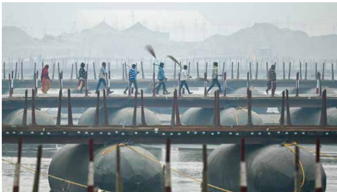
Laborers walk across a floating pontoon bridge on the banks of river Ganges, ahead of the Maha Kumbh Mela festival in Prayagraj.

"What makes this event unique is its magnitude and the fact that no invitations are sent to anybody... Everyone comes on their own, driven by pure faith,"