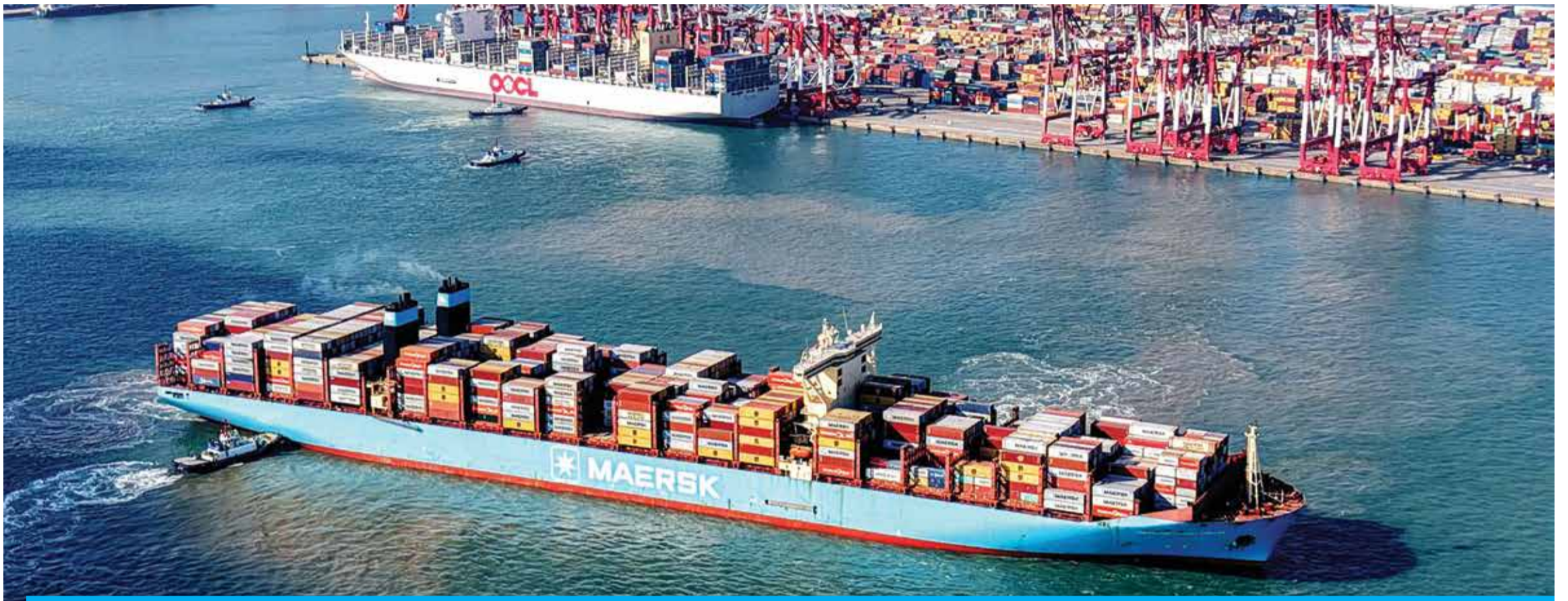
A cargo ship loaded with containers sails from the Qingdao port in Qingdao, in eastern China's Shandong province on December 26, 2024.

Policymakers pledge more stimulus to keep growth stable in 2025