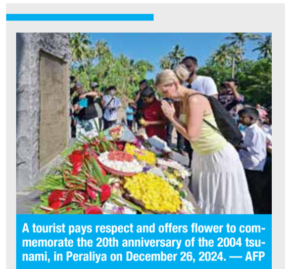
A tourist pays respect and offers flower to commemorate the 20th anniversary of the 2004 tsunami, in Peraliya on December 26, 2024.