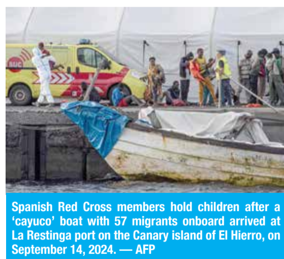
Spanish Red Cross members hold children after a 'cayuco' boat with 57 migrants onboard arrived at La Restinga port on the Canary island of El Hierro, on September 14, 2024.

It blamed the use of flimsy boats and increasingly dangerous routes as well as a lack of resources for rescues for the surge in deaths. "These figures are evidence of a profound failure of rescue and protection systems. More than 10,400 people dead or missing in a single year is an unacceptable tragedy," the group's founder, Helena Maleno, said in a statement. The victims were from 28 nations, mostly in