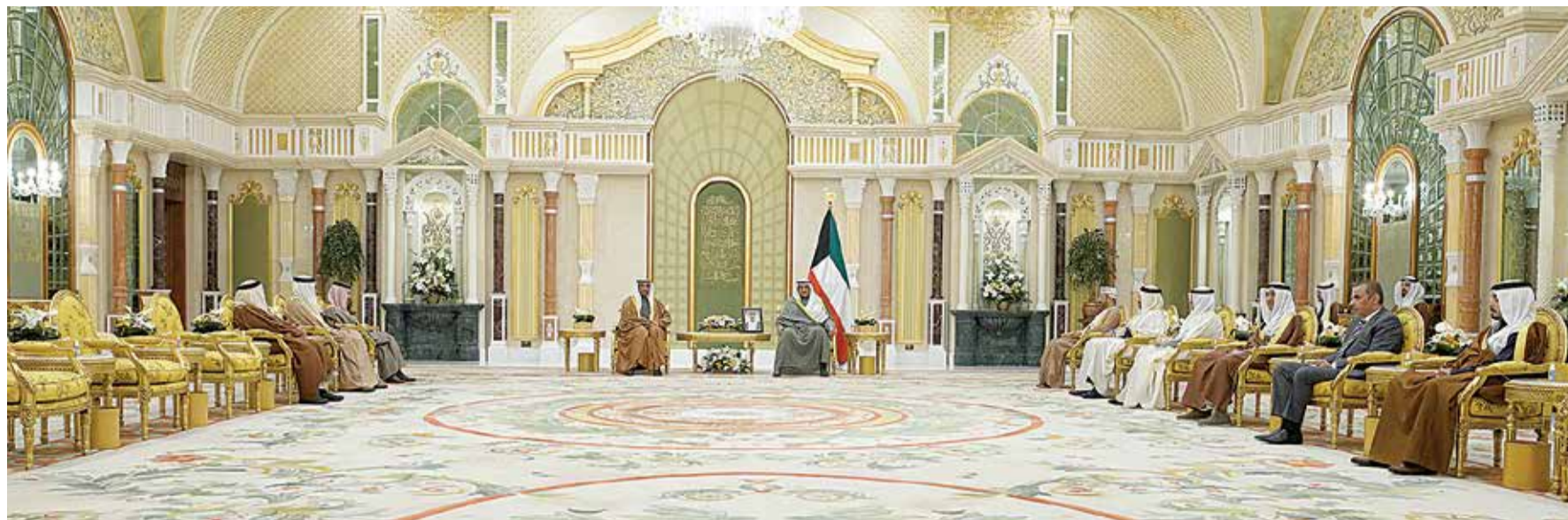
KUWAIT: HH the Crown Prince Sheikh Sabah Al-Khaled Al-Hamad Al-Sabah meets with Kuwaiti Foreign Minister Abdullah Al-Yahya, GCC Secretary General Jasem Al-Budaiwi and GCC member states' foreign ministers.

KUWAIT: His Highness the Crown Prince Sheikh Sabah Al-Khaled Al-Hamad Al-Sabah warmly received, on Thursday, at Bayan Palace, the Minister of Foreign Affairs, Abdullah Al-Yahya, and the Secretary-General of the Gulf Cooperation Council (GCC), Jasem Mohammed Al-Budaiwi. The meet-