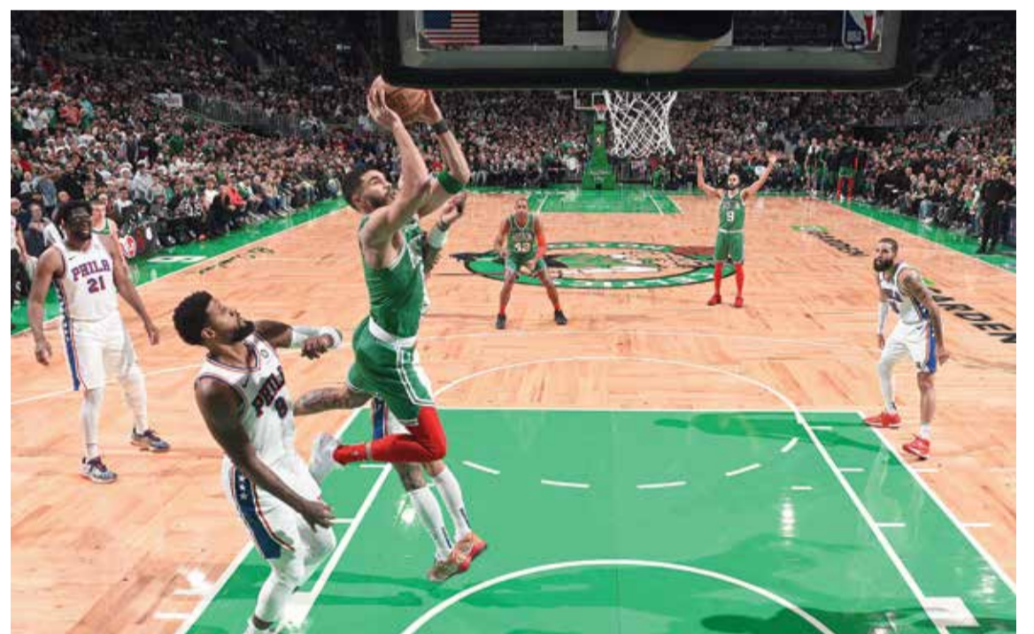
BOSTON: Jayson Tatum #0 of the Boston Celtics drives to the basket during the game against the Philadelphia 76ers on December 25, 2024 at the TD Garden in Boston, Massachusetts.

French star Wembanyama put up 42 points with 18 rebounds and four blocks for the Spurs but Bridges took the glory with a brilliant