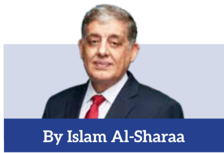
By Islam Al-Sharaa

A land rich in ancient heritage, breathtaking landscapes, and unforgettable cultural experiences, Turkiye offers a journey like no other. Recently, Kuwait Times embarked on a remarkable trip exploring the profound legacy of Rumi, the iconic Sufi poet and philosopher whose teachings transcend time and borders.