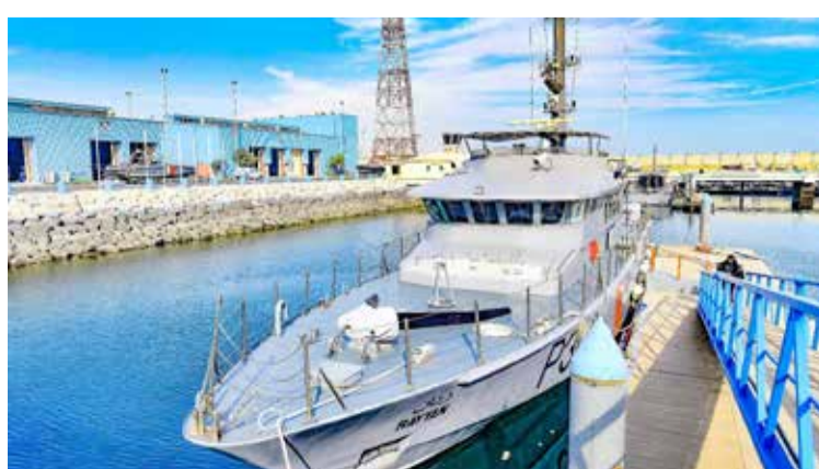
The Sabah Al-Ahmad Naval Base