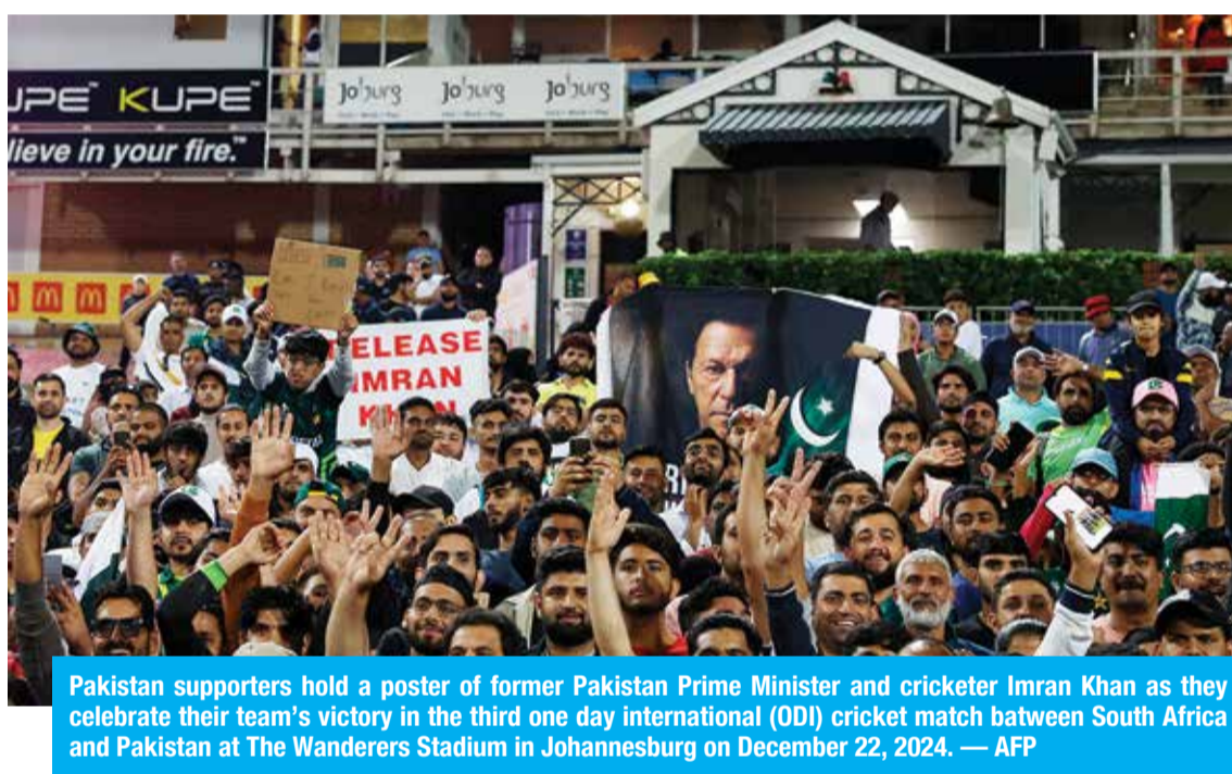
Pakistan supporters hold a poster of former Pakistan Prime Minister and cricketer Imran Khan as they celebrate their team's victory in the third one day international (ODI) cricket match between South Africa and Pakistan at The Wanderers Stadium in Johannesburg on December 22, 2024.

"These military courts lack judicial independence, transparency, and due process guarantees," US State Department spokesman Matthew Miller said in a statement. Announcing 60 more convictions on Thursday, the military said the court martial had