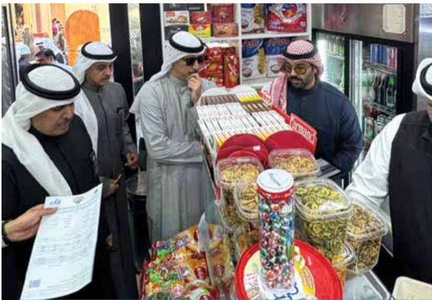
KUWAIT: Officials inspect Souq Al-Mubarakiya to enhance consumer protection during Khaleeji Zain 26.

The organizing committee for Khaleeji Zain 26 has emphasized the importance of the volunteers' contributions, which are expected to leave a lasting impression on visitors. As the tournament continues, these volunteers are playing a significant role in ensuring the event runs smoothly and providing a positive experience for all involved. — KUNA