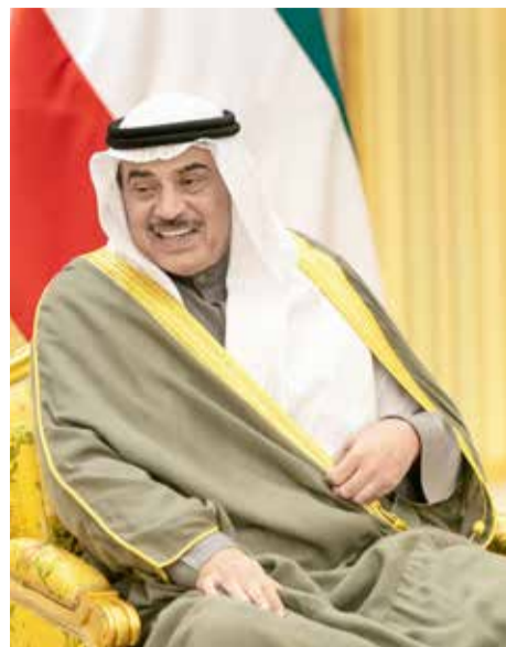
HH the Crown Prince Sheikh Sabah Al-Khaled Al-Hamad Al-Sabah.