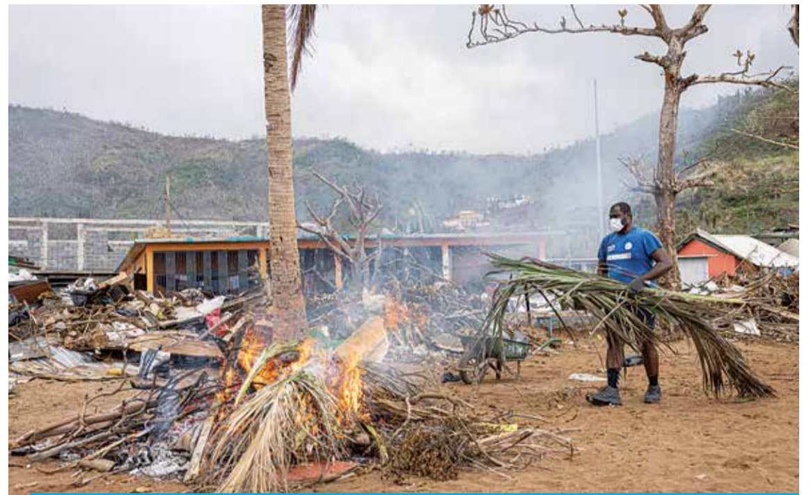
A resident burns foliage and debris in the town of Acoua, days after Chido wreaked havoc on the French Indian Ocean territory of Mayotte on December 25, 2024.

But when analyzed 19 policy and advisory documents that form this green finance strategy, it is found they overwhelmingly think of risks in terms of how they affect investors or the market. There is lots of talk of uncertainty around financial returns, or the chances of losing consumer confidence due to "greenwashing". Just one document, a discussion of "natural capital", provides specific examples of ethical and cultural threats for rural communities.