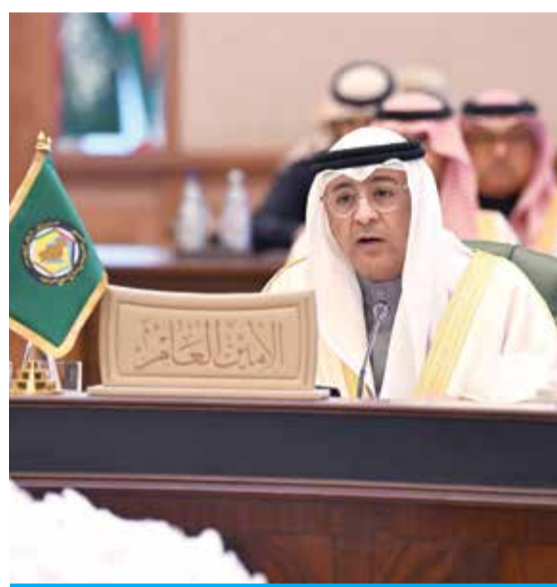
Secretary-General of the Gulf Cooperation Council (GCC), Jasem Al-Budaiwi