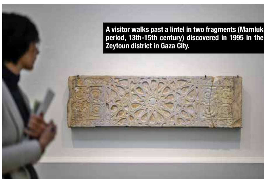
A visitor walks past a lintel in two fragments (Mamluk period, 13th-15th century) discovered in 1995 in the Zeytoun district in Gaza City.

"The forces of obscurantism understand that cultural property is what is at stake for civilization, because they have never stopped wanting to destroy this heritage, as in Mosul," said Geneva city councillor Alfonso Gomez - a reference to the northern Iraqi city captured by the Islamic State jihadist