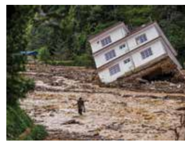
Nepalis fear more floods as climate change melts glaciers