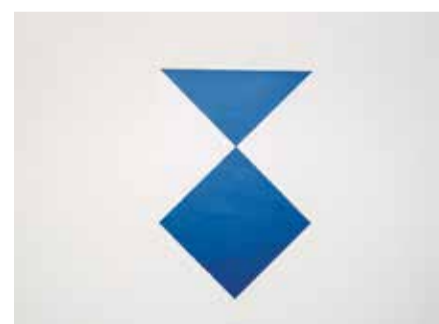
The Blue Shield symbol used to signify cultural sites protected by the 1954 Hague Convention for the protection of cultural property in armed conflict during an exhibition on protection of cultural property.