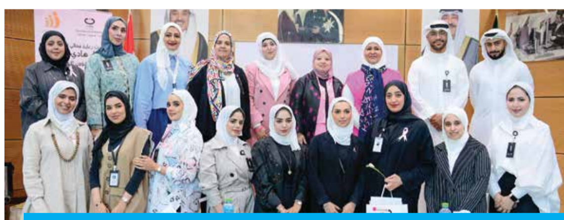
KUWAIT: Participants pose for a photo at the seminar.

main reforms that the fund must execute in the next five years, to preserve the body's significant role on all levels, the ministry said. Kuwait is hosting the next GCC financial and economic cooperation committee meeting in 2025. — KUNA