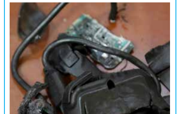
BEIRUT: Photo taken in Beirut's southern suburbs shows the remains of exploded pagers.

DUBAI: Dubai-based airline Emirates has banned pagers and walkie-talkies onboard its planes following sabotage attacks in Lebanon, and extended flight cancellations for Middle East destinations due to regional escalation. "All Passengers travelling on flights to, from or via Dubai are prohibited from transporting pagers and walkie-talkies in checked or cabin baggage," the carrier said, weeks after a wave of exploding communication devices used by the Iran-backed Hezbollah group, which blamed Zionists for the attacks.