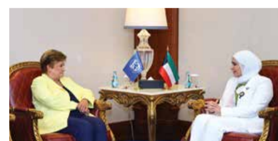
DOHA: Kuwait Finance Minister Noura Al-Fassam is seen with Managing Director of the International Monetary Fund (IMF) Kristalina Georgieva.

It also highlighted the future role of the IMF in boosting the international economy and enhancing global economic cooperation and showcased the