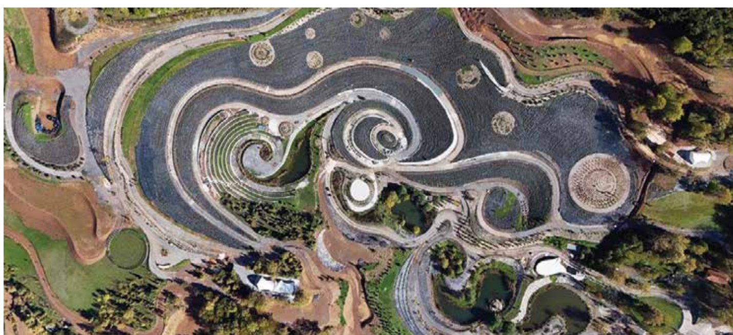
This aerial photograph shows the "Starry Night" park.