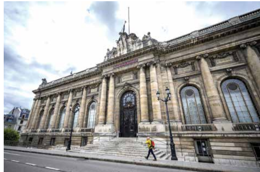
A man walks past the entrance of the Art and History Museum hosting the exhibition on protection of cultural property in case of conflict entitled "Heritage in Peril" in Geneva.