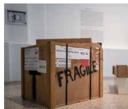
Boxes of artefacts from Gaza Strip originally kept in a secure hangar in Geneva since 2007, during an exhibition on protection of cultural property in case of conflict entitled "Heritage in Peril".