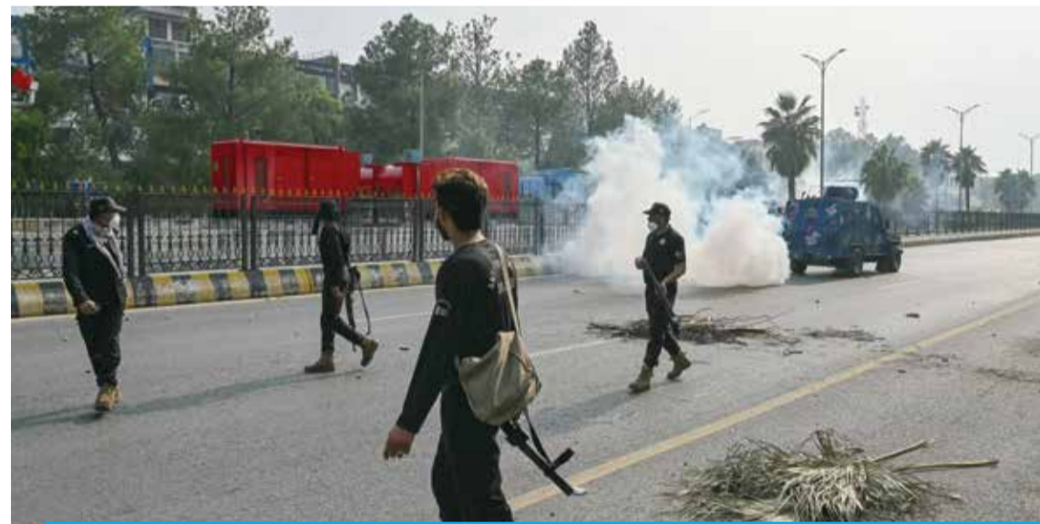
ISLAMABAD: Policemen fire tear gas shells to disperse supporters of jailed former prime minister Imran Khan's Pakistan Tehreek-e-Insaf (PTI) party during a protest in Islamabad on Oct 5, 2024.

On Saturday, two missing people were found dead