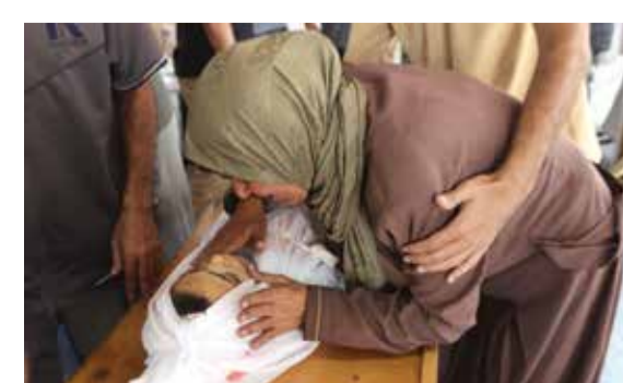
GAZA CITY: A Palestinian woman mourns over the body of a relative after a Zionist strike on Gaza City's Zaytoun neighborhood on October 5, 2024.