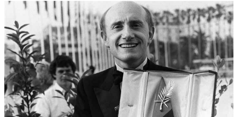
Actor, director and screenwriter Michel Blanc poses with the Best Actor prize he shared with Bob Hoskins for their respective roles in "Tenue de soirée" by Bertrand Blier and "Mona Lisa" by Neil Jordan on May 19, 1986 at the 39th Cannes International Film Festival in Cannes.