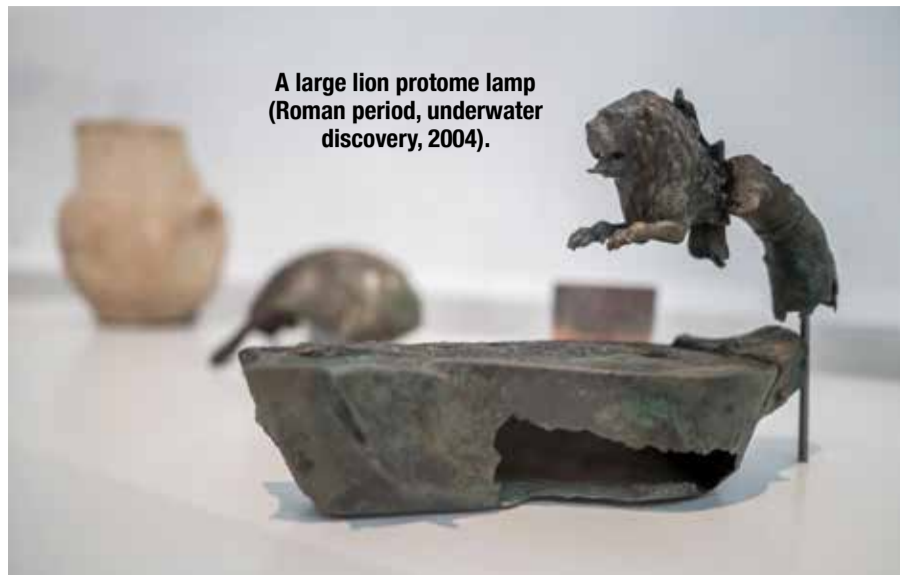
A large lion protome lamp (Roman period, underwater discovery, 2004).