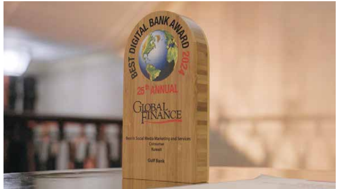
Best Digital Banking Award 2024

"Gulf Bank has prioritized social media for several years to align with customer expectations and deliver exceptional services," she added. "We have assembled a highly trained team committed to providing tailored support through text-based communication, efficiently addressing customer needs across multiple platforms."