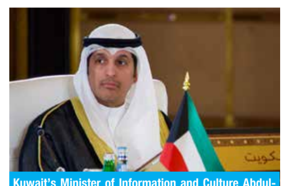
Kuwait's Minister of Information and Culture Abdulrahman Al-Mutairi

The Secretary-General of the GCC, Jassem