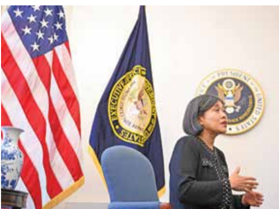
WASHINGTON: US Trade Representative Katherine Tai speaks during an interview at the Office of the US Trade Representative in Washington, DC on October 3, 2024.

The extra duties also apply, at various rates, to vehicles made in China by foreign groups such as Tesla — which faces a tariff of 7.8 percent. Chinese car giant Geely — one of the country's largest sellers of EVs — said Friday's decision was "not constructive and may hinder EU-China economic and trade relations, ultimately harming European companies and consumer interests". Brussels says it aims to protect European carmakers in a critical industry that provides jobs to around 14 million people across the European Union but does not benefit from massive state subsidies like in China. Canada and the United States have in recent months imposed much higher tariffs of 100 percent on Chinese electric car imports. Trade tensions between China and the EU are not limited to electric cars, with Brussels also investigating Chinese subsidies for solar panels and wind turbines. The bloc faces a difficult task as it tries to foster its clean tech industry and invest in the green transition without sparking a painful trade war with China. — AFP