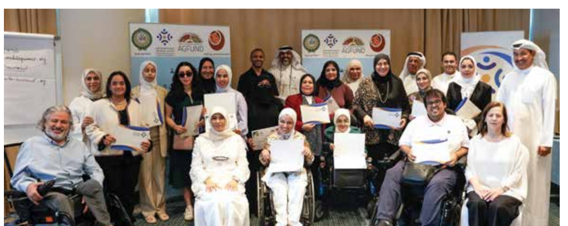
KUWAIT: Participants pose for a group photo.

In recent years, the bank has introduced several eco-friendly banking innovations including biodegradable and virtual cards. It has also expanded and advanced its online banking experience, reducing the need for customers to commute to the physical branches as well as significantly cutting down on paper consumption. These services include SMS and digital onboarding, eKYC (digital know-your-customer protocol), and the option to open numerous bank accounts, such as Kanz and Al Rateb, online in less than a minute.