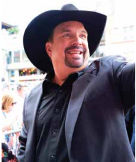
Garth Brooks attends the 17th Academy Of Country Music Honors at Ryman Auditorium.

In an Instagram post centered on his Thursday concert, Brooks wrote that "If there was ever a night that I really needed this, TONIGHT was that night!" alongside an image of The Colosseum at Caesars Palace where he's set to continue a residency through early 2025. Brooks surged to international fame in the 1990s, with hits including "Friends in Low Places" and "The Dance." In 2015, he topped Elvis Presley for the highest number of albums sold by a male artist.