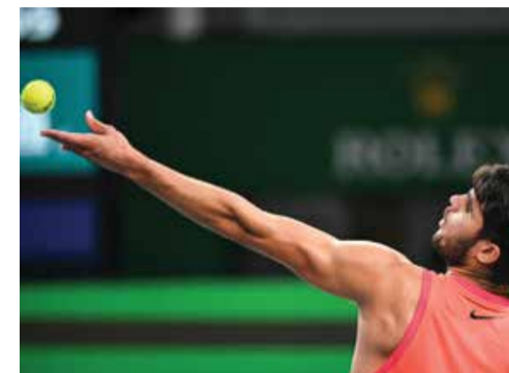
SHANGHAI: Spain's Carlos Alcaraz serves to China's Shang Juncheng during their men's singles match at the Shanghai Masters tennis tournament in Shanghai on October 5, 2024.

The tournament lost its second top-ten player on Saturday, as Andrey Rublev fell to 19-year-old