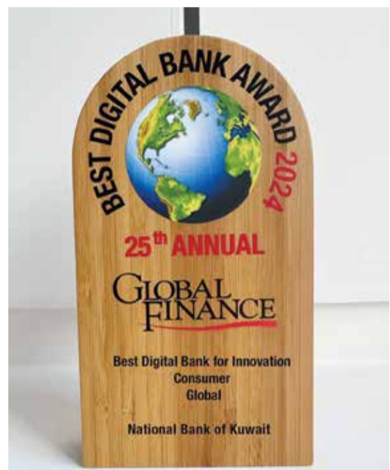
The Best Bank for Innovation

Regionally, NBK was named "Best in Innovation - Middle East", and "Best Online Product Offerings - Middle East" Locally, NBK monopolized Global Finance awards, with 6 wins out of the 10 awards presented by the magazine to banks in Kuwait. In addition to "Best in Innovation - Kuwait" and "Best Online Product Offerings - Kuwait", the awards included: "Best Bill Payment and Presentation - Kuwait", "Best Mobile Banking App - Kuwait", "Best in