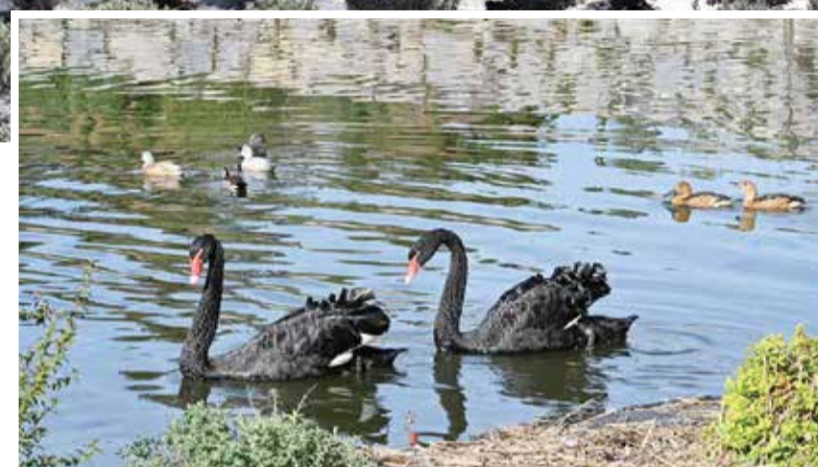
Black swans and ducks swim on an artificial lake in "Starry Night" park.