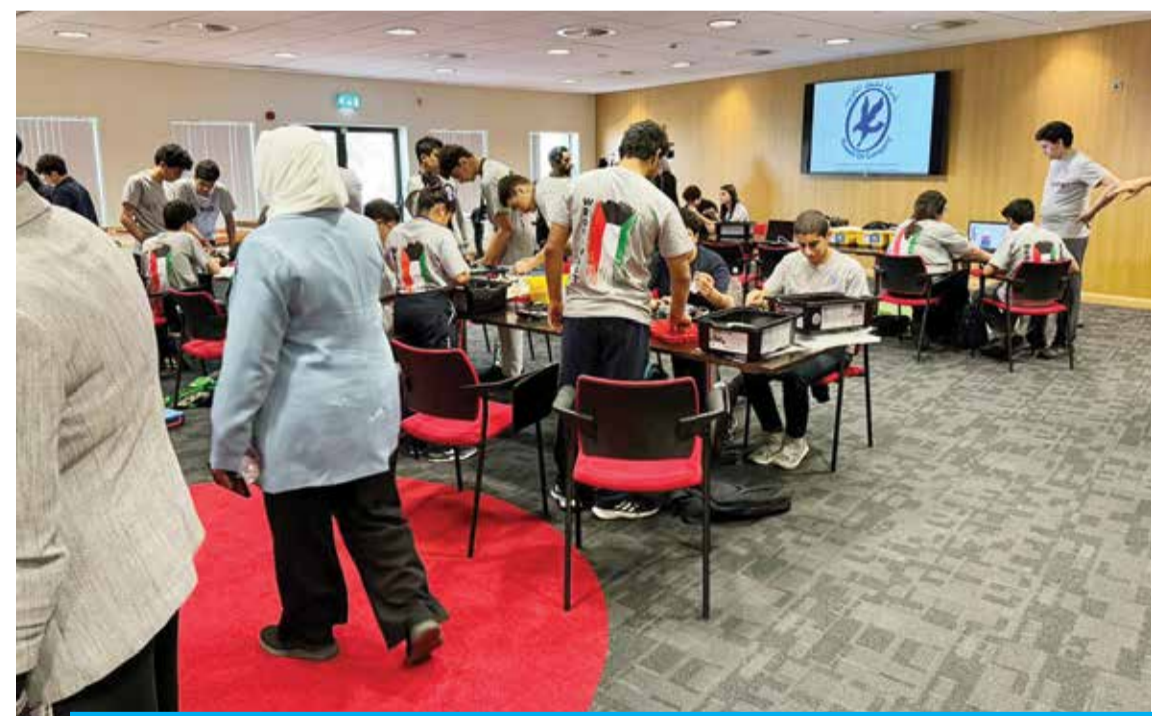
Part of the activities of the qualifiers.