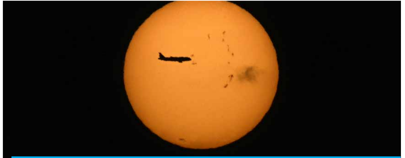
KUWAIT: A commercial aircraft flies in front of the sun over Kuwait City on October 3, 2024.