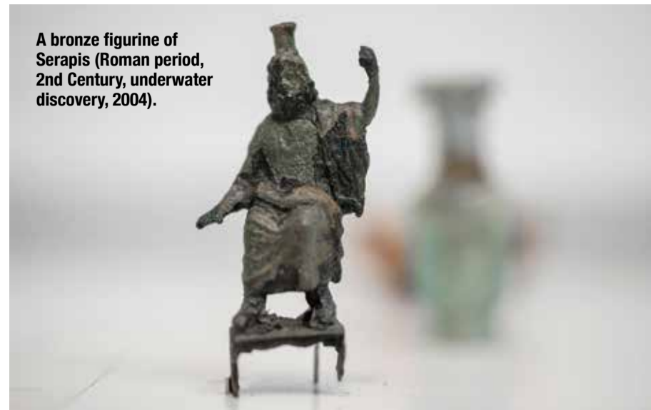
A bronze figurine of Serapis (Roman period, 2nd Century, underwater discovery, 2004).