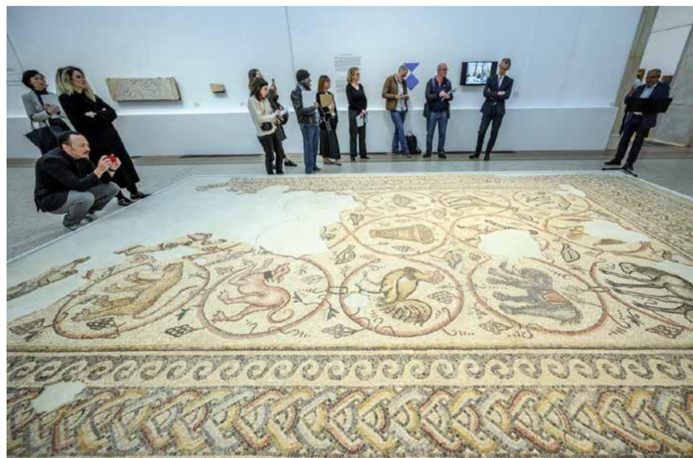
A mosaic pavement (Byzantine period, 579 AD) collected in 1997 from the site of a vanished Byzantine church in Deir-el-Balah in the Gaza Strip, displayed during an exhibition on the protection of cultural property in case of conflict entitled "Heritage in Peril", at the Art and History Museum in Geneva on October 3, 2024. — AFP photos

According to the Swiss Museums Association, Switzerland, along with counterparts in other countries, has also been able to help more than 200 museums in Ukraine preserve their collections after Russia's full-scale invasion in February 2022. — AFP