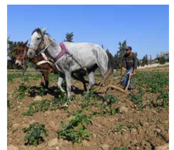
FERNANA, Tunisia: A farmer plows a field in north-western Tunisia's Fernana town.