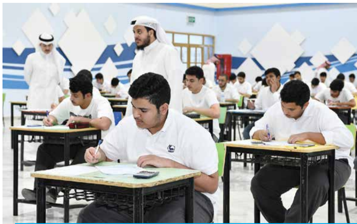
KUWAIT: Teachers proctor during the final exams in this file photo.

World Teachers' Day has been observed annually since 1994 to commemorate the signing of the UNESCO and International Labour Organization's recommendation on the status of teachers in 1966. This recommendation sets benchmark indicators related to the rights and responsibilities of teachers, standards for their initial preparation and ongoing training, em-