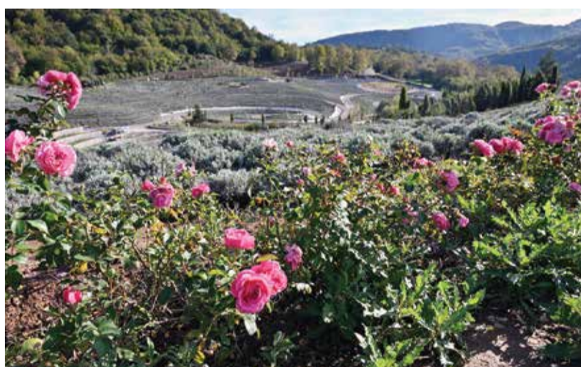
Rose bushes at the "Starry Night" park landscape, inspired by Van Gogh's work.

The former insurance company owner, who now works in tourism,