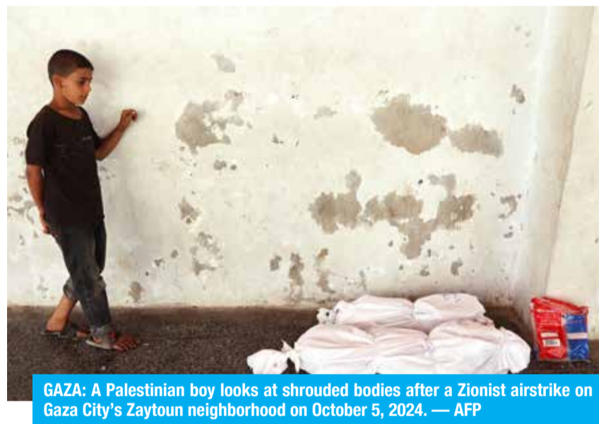
GAZA: A Palestinian boy looks at shrouded bodies after a Zionist airstrike on Gaza City's Zaytoun neighborhood on October 5, 2024.

BEIRUT: Hezbollah said Saturday its fighters were confronting Zionist troops in Lebanon's southern border region, where Zionist military said it struck militants from inside a mosque. Rapidly escalating violence in recent days saw intense airstrikes on Hezbollah strongholds across Lebanon as ground troops conducted raids near the border, transforming nearly a year of cross-border exchanges into full-blown war.