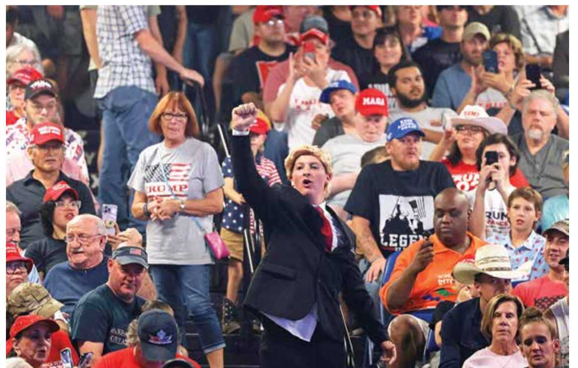
FAYETTEVILLE, US: A supporter of US President and Republican presidential candidate Donald Trump cheers ahead of a town hall event at the Crown Complex in Fayetteville, North Carolina, on October 4, 2024. — AFP

There was shock across the political spectrum