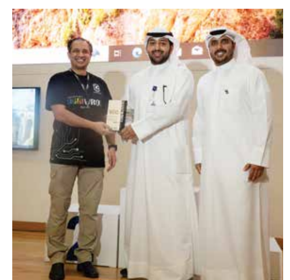
Honoring the company by the organizing committee for the qualifying rounds.

It is worth noting that the World Robot Olympiad is an international robotics competition that witnesses the participation of over 100 countries held for over 20 years. The competition provides a platform for young innovators to tackle real-world challenges through technology, inspiring them to apply their skills toward building a more sustainable and technologically advanced future.