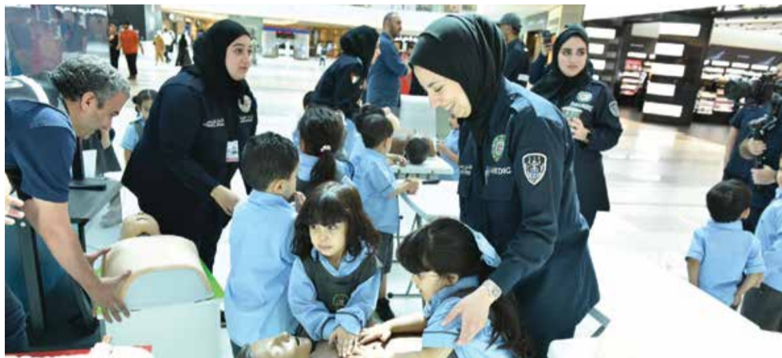
KUWAIT: Emergency personnel teach participants how to perform CPR during a health ministry event held at The Avenues mall.