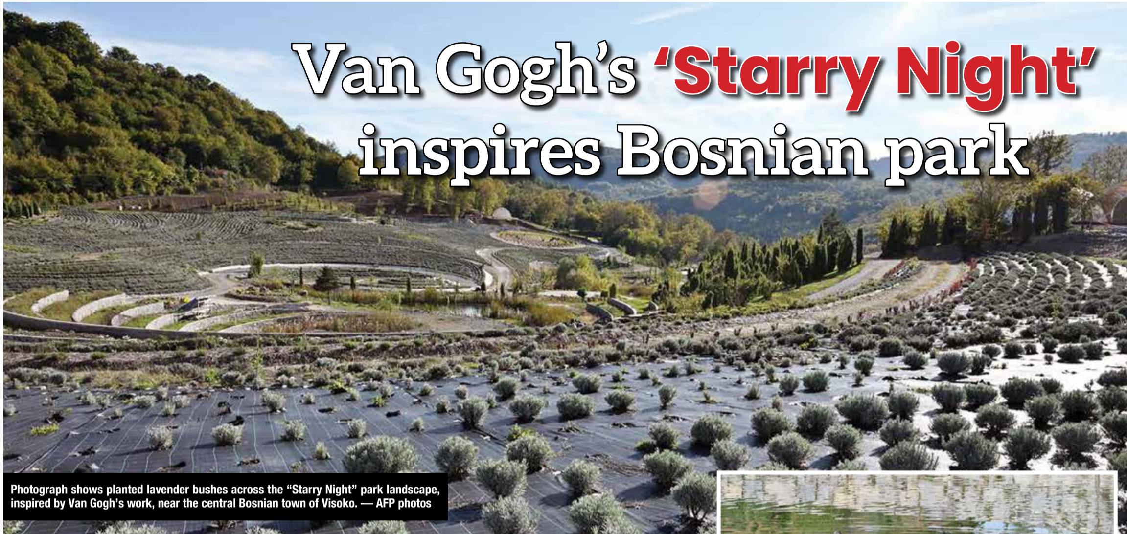
Photograph shows planted lavender bushes across the "Starry Night" park landscape, inspired by Van Gogh's work, near the central Bosnian town of Visoko.