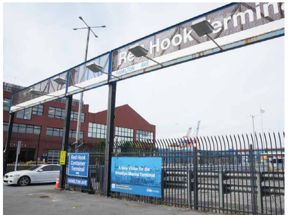
BROOKLYN, US: A car leaves the Red Hook Terminal in Brooklyn on October 4, 2024.

Banks in Britain, which have seen profits surge thanks to higher interest rates, have intensified