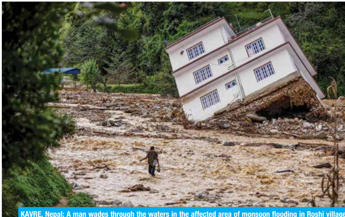
KAVRE, Nepal: A man wades through the waters in the affected area of monsoon flooding in Roshi village of Nepal's Kavre district.