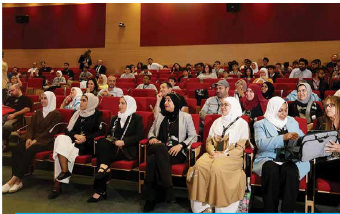
Huge turnout to watch the contestants.