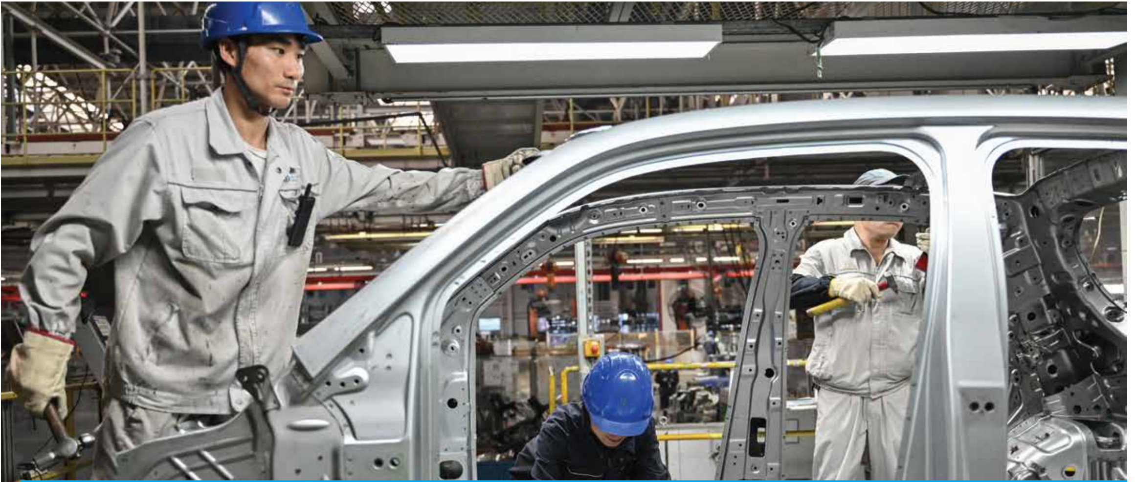
JINHUA, China: Employees work on an electric vehicle (EV) production line at the Leapmotor factory in Jinhua, China's eastern Zhejiang province.