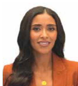
Sheikha Nabila Salman Al-Humoud Al-Sabah

oral contraceptives, as this can increase the risk of breast cancer. She stressed the significance of regular breast examinations for early detection, which is crucial for effective treatment when tumors are still small. According to her, self-examinations identify 25 percent of cases, while mammograms can detect 90 percent of cases in women over 40. At the end of the lecture, booklets and brochures promoting awareness about breast cancer were distributed.