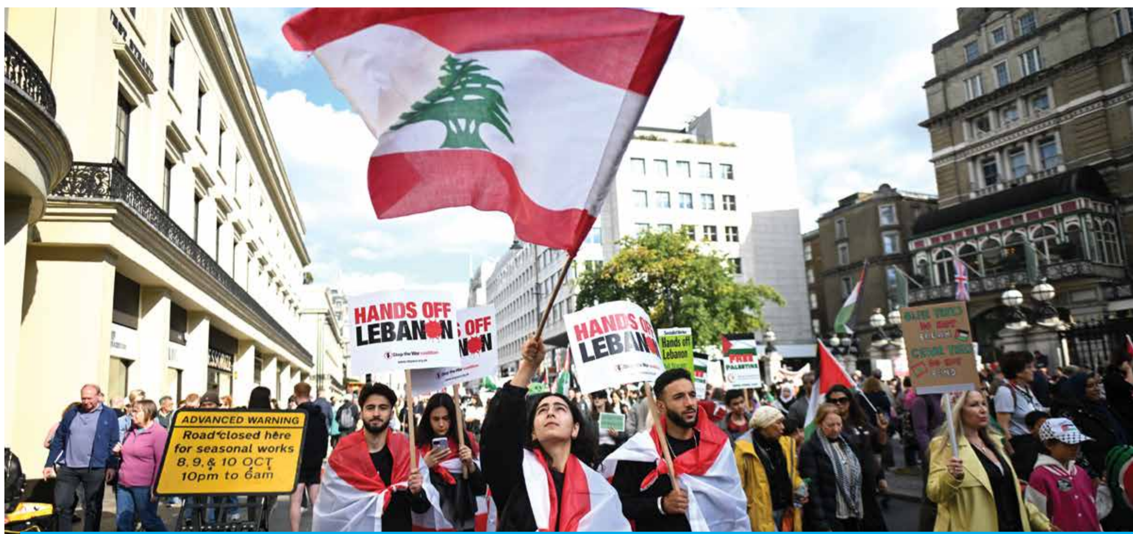
LONDON: Pro-Palestinian activists and supporters wave flags and hold placards as they pass through central London, during a March for Palestine on October 5, 2024.