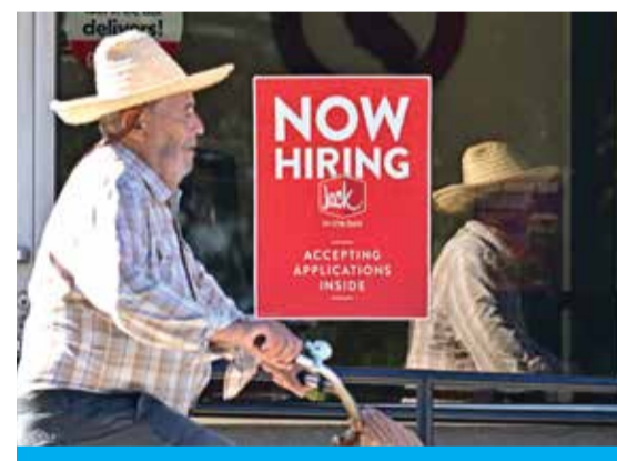
SAN GABRIEL, US: A cyclist rides past a 'Now Hiring' sign posted on a business storefront in San Gabriel, California on Aug 21, 2024.

A consensus estimate by Dow Jones had expected growth of 150,000. The unemployment rate dipped from 4.2 percent to 4.1 percent, the report added. President Joe Biden lauded the job creation, adding in a statement that unemployment remains low and wages are growing faster than prices. But he stressed: "We