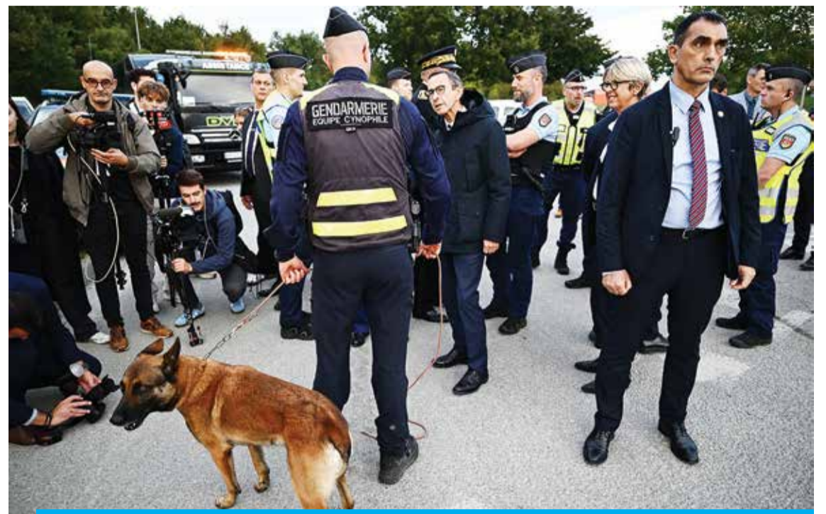
LES ESSARTS, France: France's Minister of Interior Bruno Retailleau (center) speaks with a gendarme of the canine "cynophile" unit during a French gendarmerie operation on the A83 highway toll in Les Essarts, western France. — AFP

The number of migrants arriving in Britain by crossing the Channel in small boats has topped 25,000 since the start of the year. Stopping the small boat arrivals on England's southern coast was a key issue in Britain's general election in July. British Interior Minister Yvette Cooper has said the government aims over the next six months to achieve the highest rate of deportations of failed asylum seekers in five years. — AFP