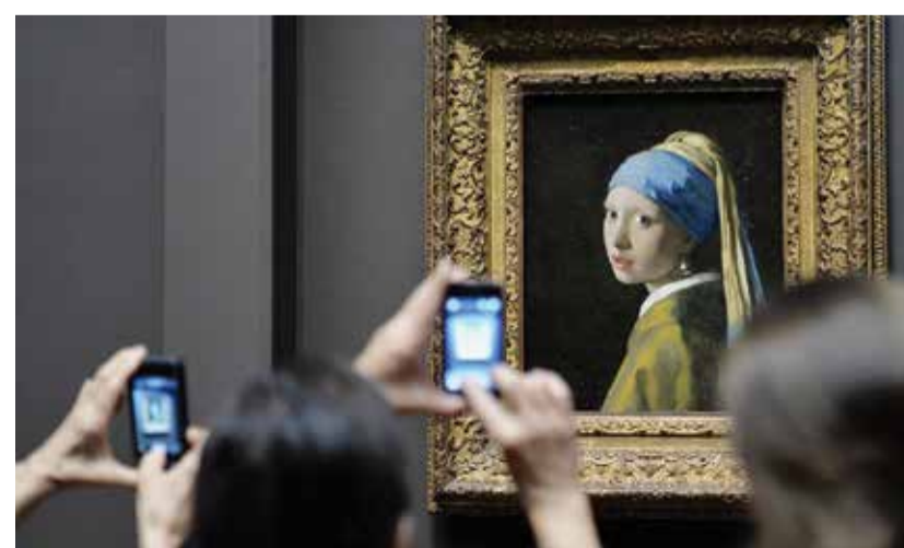
Visitors look at the Johannes Vermeer's painting "Girl with a Pearl Earring" at the Frick Collection in New York, on October 21, 2013.