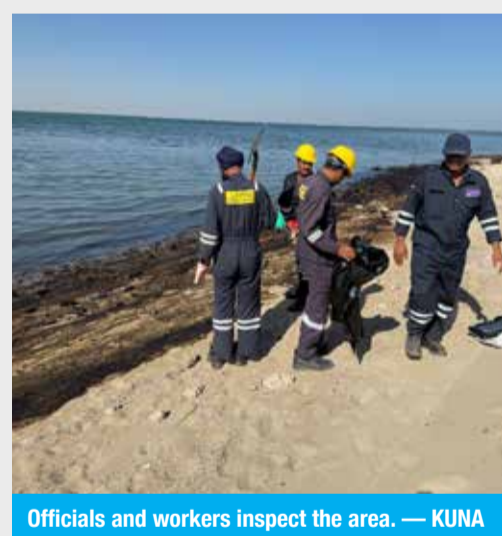
Officials and workers inspect the area.