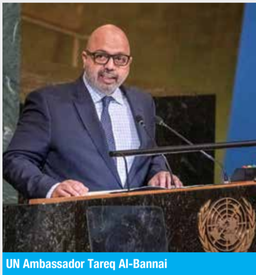
UN Ambassador Tareq Al-Bannai

Al-Bannai appreciated The Bahamas' role in defending Kuwait's legitimacy in the UN during the Iraqi occupation of the country in 1990-1991. He noted that Kuwait and The Bahamas support each other in elections of the different UN agencies, including the Security Council (UNSC), the Human Rights Council (OHCHR), and the Economic and Social Council (ECOSOC). — KUNA