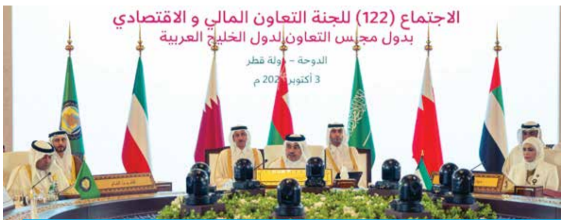
GCC delegates are seen during the 122nd meeting of the Financial and Economic Cooperation Committee of the GCC countries held in Doha.