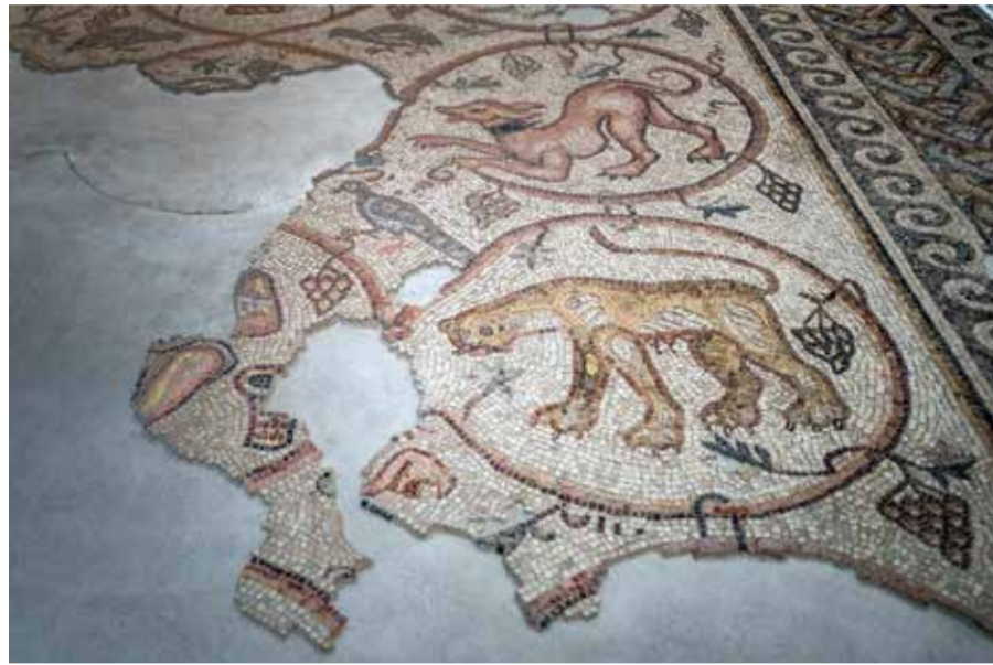
A mosaic pavement (Byzantine period, 579 AD) collected in 1997 from the site of a vanished Byzantine church in Deir-el-Balah.