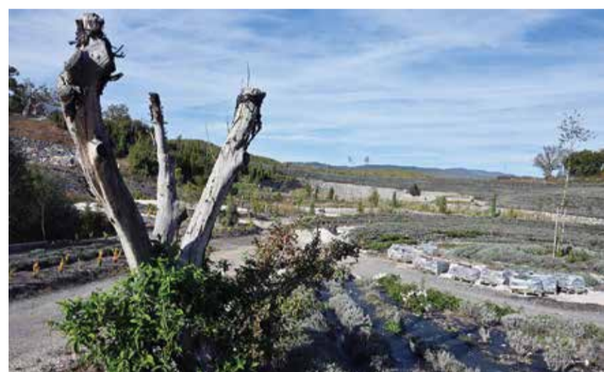
A general view of the "Starry Night" park landscape.