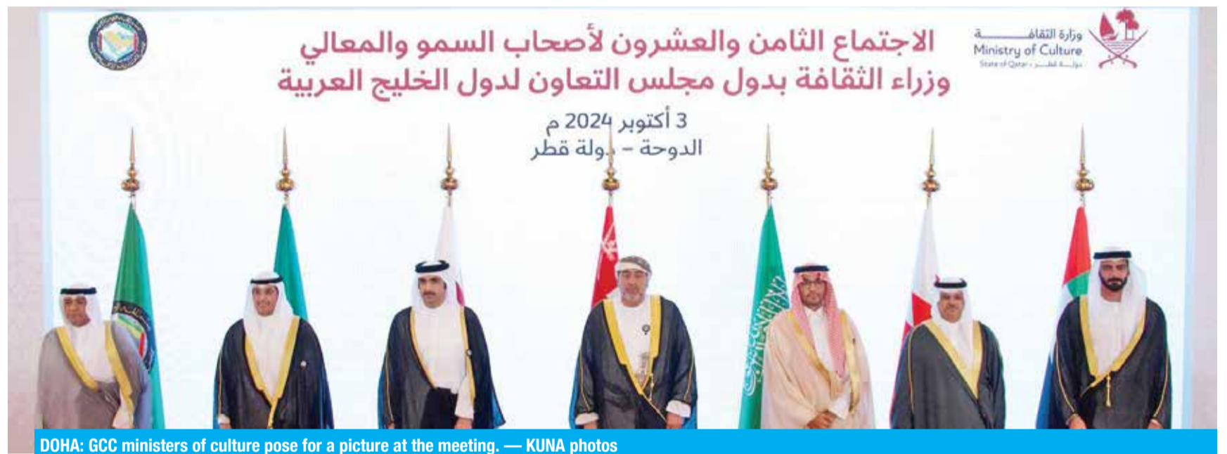
DOHA: GCC ministers of culture pose for a picture at the meeting.

Gulf cultural strategy committed to Arab-Islamic identity: Qatar representative