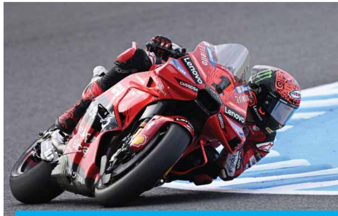
MOTEGI: Ducati Lenovo Team rider Francesco Bagnaia of Italy rides his motorcycle during the MotoGP class practice session of MotoGP Japanese Grand Prix at the Mobility Resort Motegi in Motegi, Tochigi prefecture on October 4, 2024.

She recovered her poise for 4-2 but Zheng rattled off three games in a row and served for the match, sealing the triumph on first match point when Andreeva's return drifted beyond the baseline. After reaching her first semi-final in the Chinese capital, the 21-year-old Zheng said she had played only "20-30 percent of my level." "I told myself: I am not going to win today by my tennis. I am going to win by my mentality." She was not aware of the emotions of her opponent, but said: "I cry a thousand times every time when I had a chance (and did not take it)." "But I don't usually cry during the match. I cry after the match."