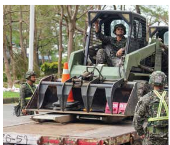
KAOHSIUNG, Taiwan: Taiwanese military personnel clear fallen trees in the aftermath of Typhoon Krathon in Kaohsiung on October 4, 2024.

On Saturday, small and scattered convoys pressed in on Islamabad in defiance of the government which approved troops for deployment on the streets — citing the need to guarantee security ahead of a Shanghai Cooperation Organization (SCO) summit