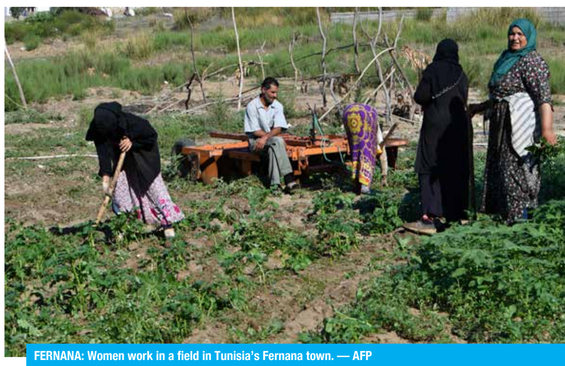
FERNANA: Women work in a field in Tunisia's Fernana town.