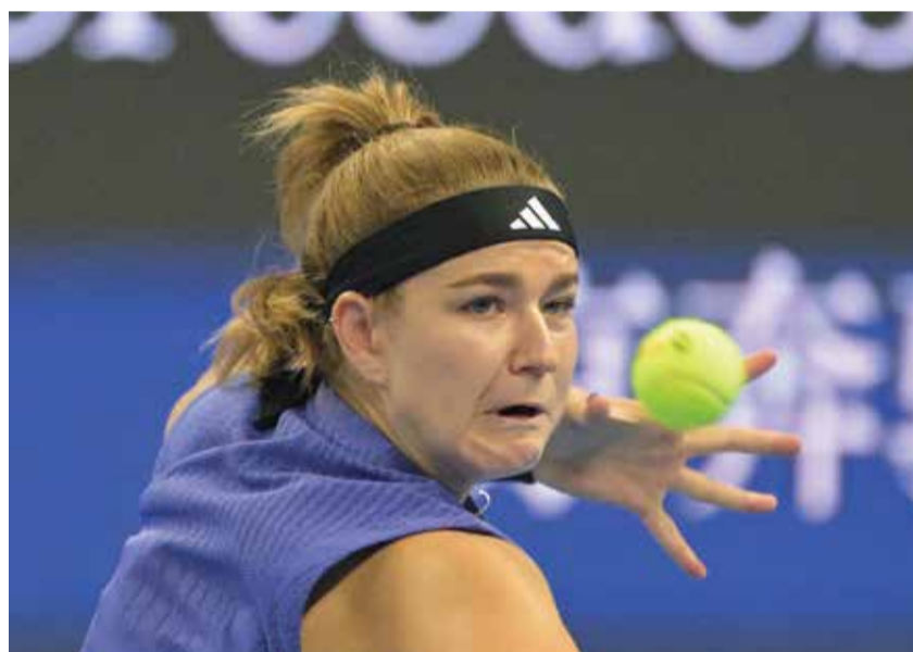
BEIJING: Czech Republic's Karolina Muchova hits a return to China's Zheng Qinwen during their women's singles semifinal match at the China Open tennis tournament in Beijing on October 5, 2024.

US Open semi-finalist Muchova had won the last two meetings between them with both going to a deciding third set. This encounter proved to be just as nervy as Sabalenka went out despite having been up 4-2 in the deciding set and seemingly on course for the semi-finals. "The conditions here are so tough, it can go one way or