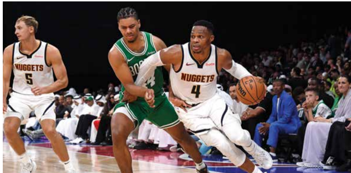
ABU DHABI: Russell Westbrook #4 of the Denver Nuggets drives to the basket during the game against the Boston Celtics on October 4, 2024.

"He's so unique in the sense of he's so unselfish," said Westbrook of the three-time MVP. "He loves to be able to make the game easy for his teammates and he's done that and won a championship and multiple MVPs and he's still the same person since I've been around. I'm grateful to be on his team and learn from him as well." Jokic had 14 points, eight rebounds, two assists, and a 71.4 field goal percentage in under 17