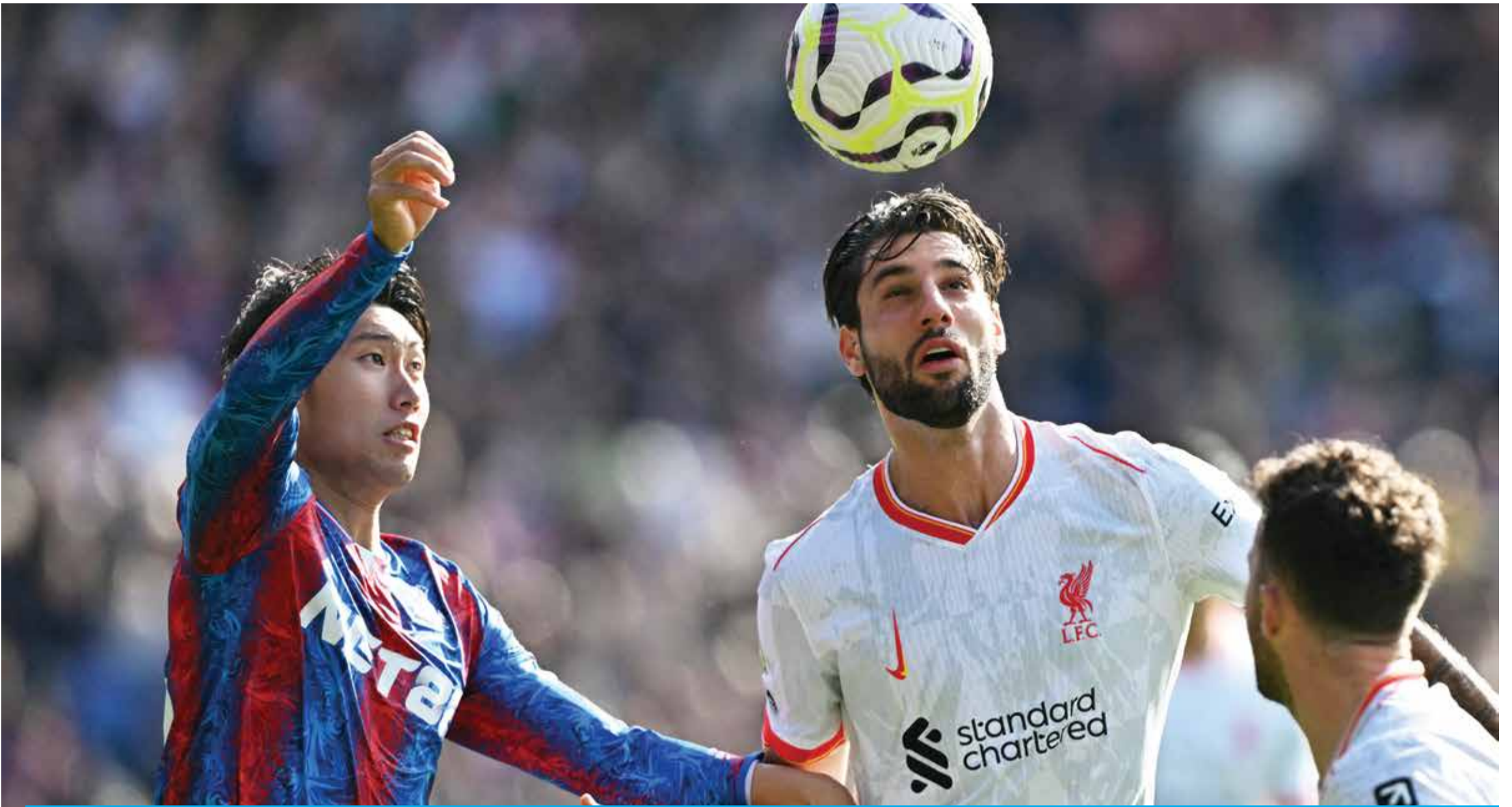
LONDON: Crystal Palace's Japanese midfielder #18 Daichi Kamada (left) vies with Liverpool's Hungarian midfielder #08 Dominik Szoboszlai (center) during the English Premier League football match between Crystal Palace and Liverpool on October 5, 2024.