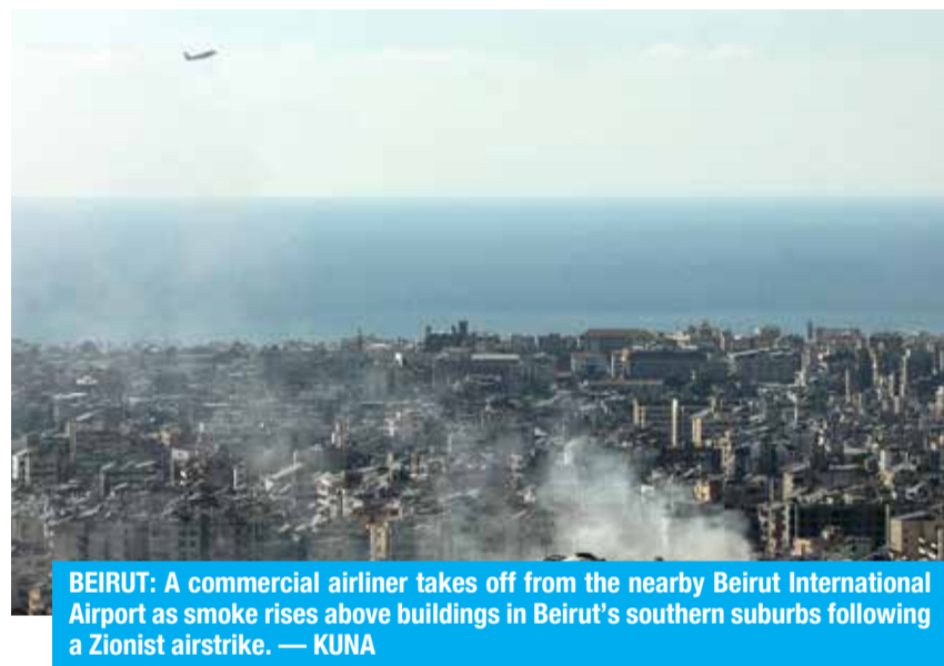
BEIRUT: A commercial airliner takes off from the nearby Beirut International Airport as smoke rises above buildings in Beirut's southern suburbs following a Zionist airstrike. — KUNA

Zionists 'preparing a response' to Iran's attack; Safieddine's contact 'lost'