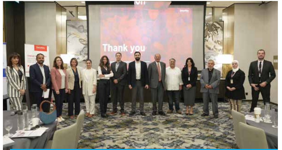
KUWAIT: Health care professionals pose for a photo at the Clinical Genomics Day Conference.