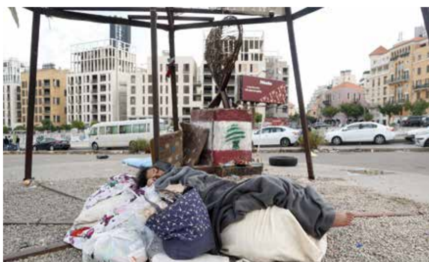
BEIRUT: A displaced girl sleeps on the side walk in downtown Beirut on Oct 1, 2024.

"A certain number of units already deployed to the Middle East region... will be extended, and the forces due to rotate into theater to replace them will now instead augment" those that are already there, Deputy Pentagon Press