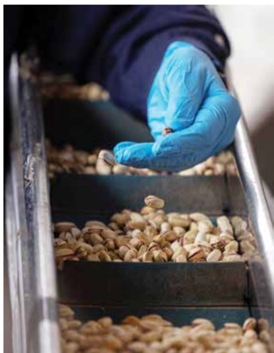
An employee processes pistachios in 'Pistamancha' cooperative.

"Wine and cereals weren't viable anymore," said the 58-year-old, who planted his first pistachio trees in 2007. "If I hadn't changed, I wouldn't have been able to make a living from my farm." In the stony plot behind him, an electric harvester latched onto