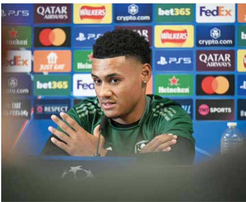
WARWICKSHIRE: Aston Villa's English striker #11 Ollie Watkins speaks during a press conference on the eve of their UEFA Champions League 1st round day 2 football match against Bayern Munich, at Bodymoor Heath Training Ground in Warwickshire, central England, on October 1, 2024.

Whether that was entirely successful is another matter as promoted Ipswich caused Villa problems with their tenacious performance. The end of Villa's five-game winning run in all competitions stopped them moving level on points with leaders