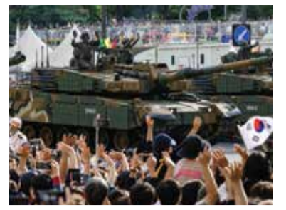
S Korean president warns North of 'regime end' if it uses nukes