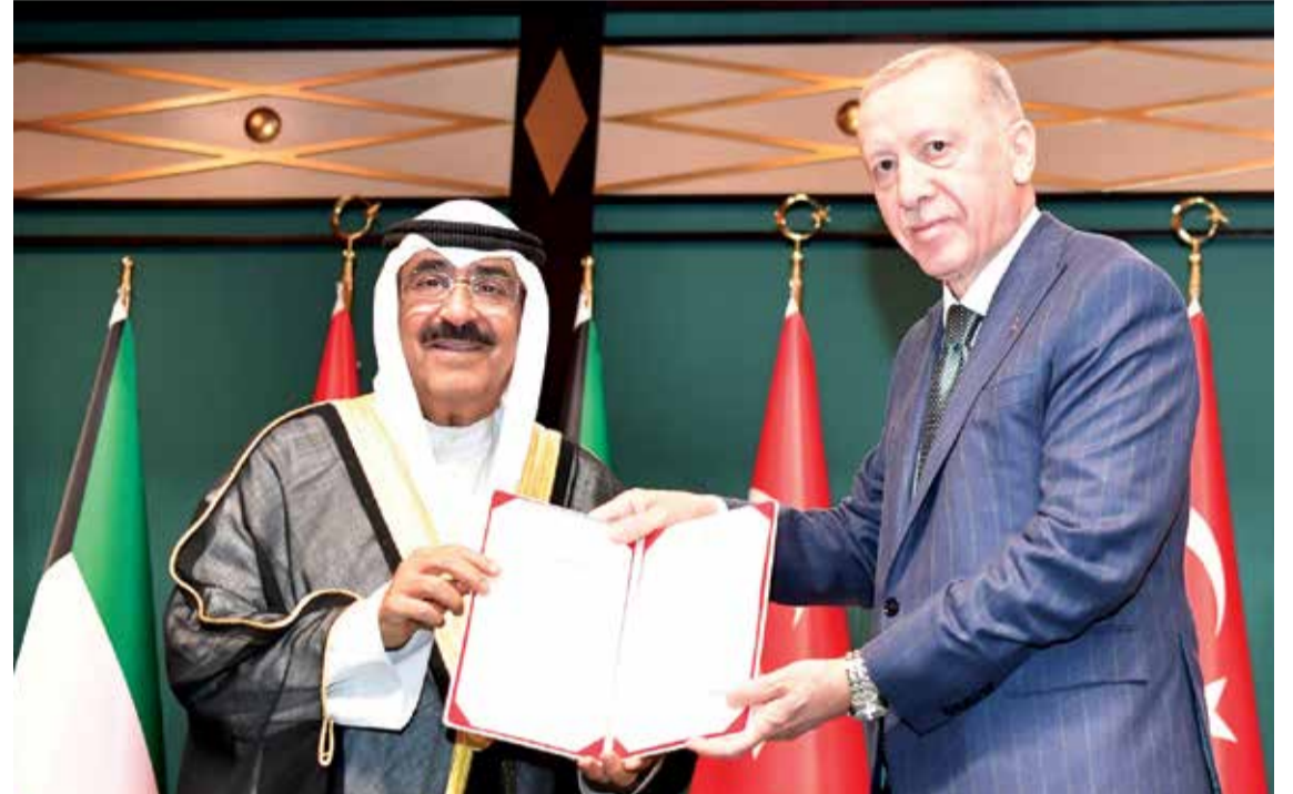
Turkish President Recep Tayyip Erdogan honors HH the Amir Sheikh Mishal Al-Ahmad Al-Jaber Al-Sabah with the State Order after a welcoming ceremony at the Presidential Palace on May 7, 2024.

KUWAIT: Since the beginning of 2024, Kuwait has continued its efforts to enhance its international relations on both bilateral and multilateral levels, guided by Amiri directives and an ambitious strategic vision aimed at solidifying its status on the global stage and achieving tangible accomplishments across various fields, particularly in diplomacy and politics. On December 16, 2023, following the announcement of His Highness Sheikh Mishal Al-Ahmad Al-Jaber Al-Sabah as the new Amir, Kuwait adopted an ambitious approach to strengthen its cooperation with international partners and global organizations while also developing its relationships with friendly and brotherly nations. The visits made by His Highness the Amir to Gulf Cooperation Council (GCC) countries at the end of January 2024 were a cornerstone in this diplomatic endeavor, especially as they marked his first official trips since assuming power. These visits underscored the commitment to enhancing Gulf integration and advancing joint cooperation to new horizons.