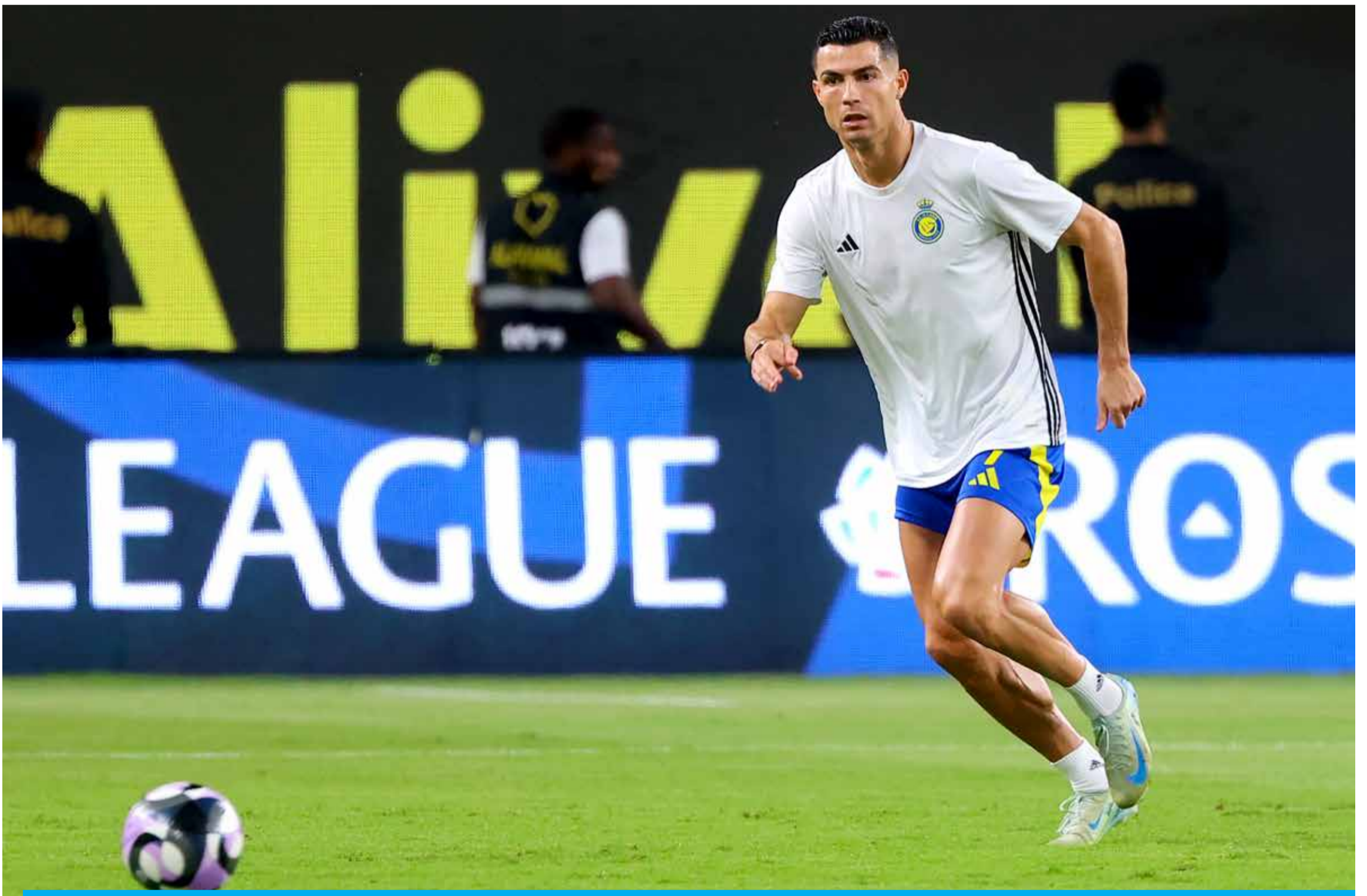
RIYADH: Al-Nassr’s Portuguese forward Cristiano Ronaldo warms up ahead of the Saudi Pro League football match between Al-Nassr and Al-Wehda at Al -Awwal Stadium in Riyadh on September 27, 2024.

New Al-Nassr coach Pioli enjoys winning Asian Champions League start