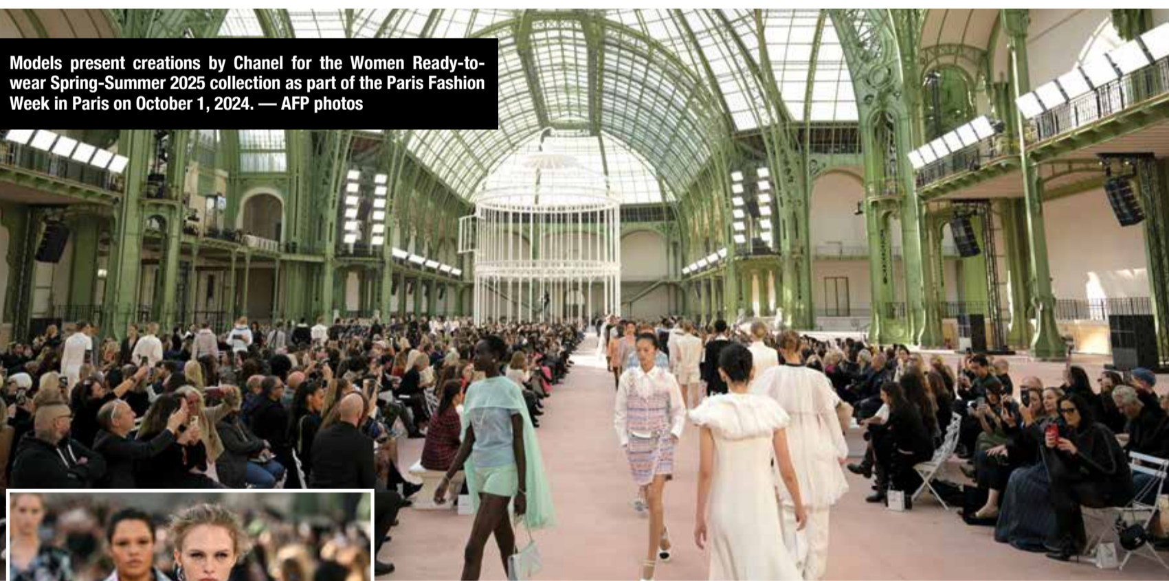
Models present creations by Chanel for the Women Ready-to-wear Spring-Summer 2025 collection as part of the Paris Fashion Week in Paris on October 1, 2024.