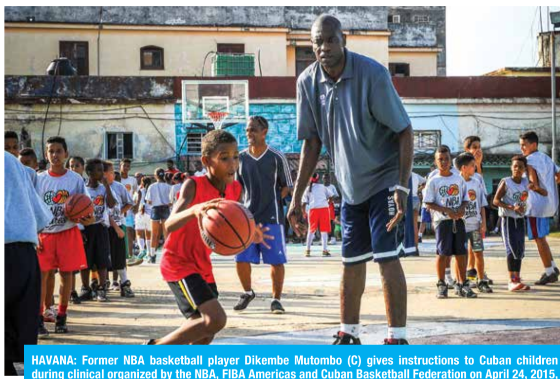
HAVANA: Former NBA basketball player Dikembe Mutombo (C) gives instructions to Cuban children during clinical organized by the NBA, FIBA Americas and Cuban Basketball Federation on April 24, 2015, in Havana.

He played five seasons with Denver before spending another five years with the Atlanta Hawks, followed by stints with Philadelphia, the