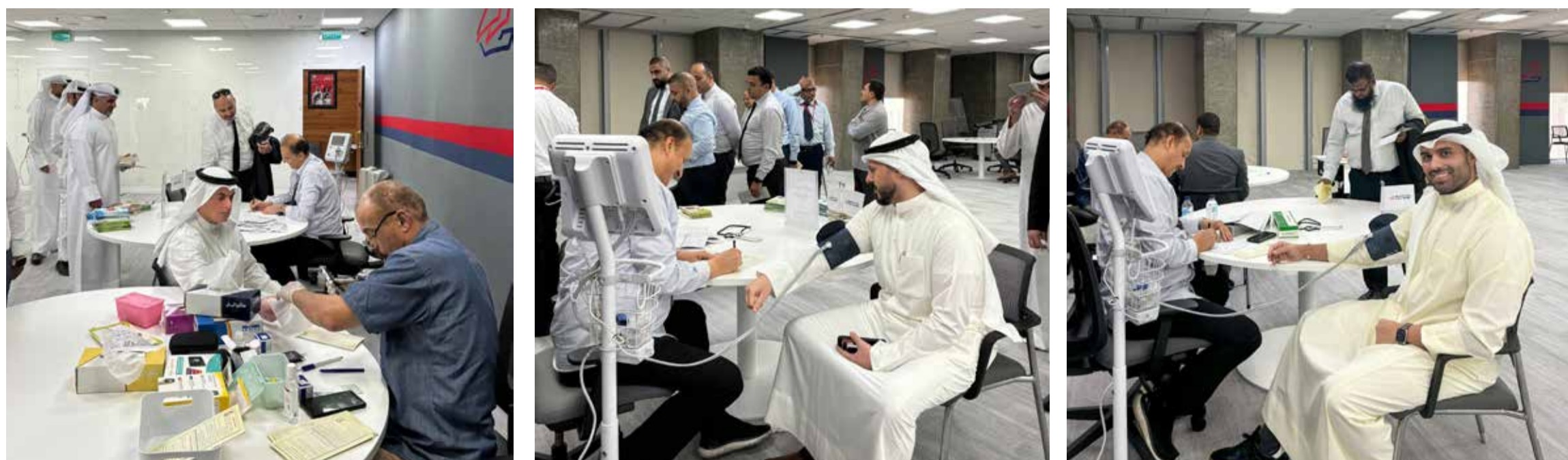
Gulf Bank in collaboration with the Kuwait Heart Foundation, conducting a health awareness campaign for its employees.

Employees receive free health screenings for diabetes, cholesterol and blood pressure