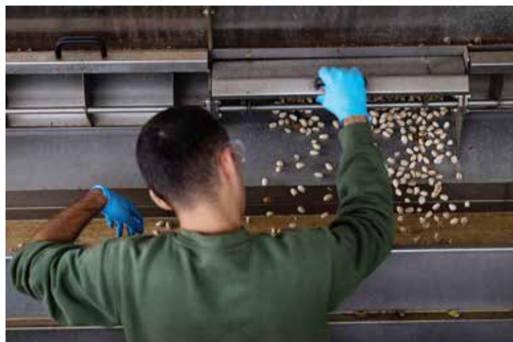
An employee processes pistachios in 'Pistamancha' cooperative.