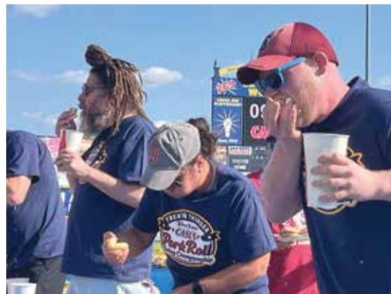
Competitors take part in a meat roll competitive eating contest in Trenton, New Jersey.

That Joey is Joey Chestnut, an eating superstar who has won 16 of the last 18 editions of the yearly Nathan’s Hot Dog Eating Contest on Coney Island, the Super Bowl of the MLE season. Because of a problem with a sponsor Chestnut did not take part this year. But he did win $100,000 by beating another competitive