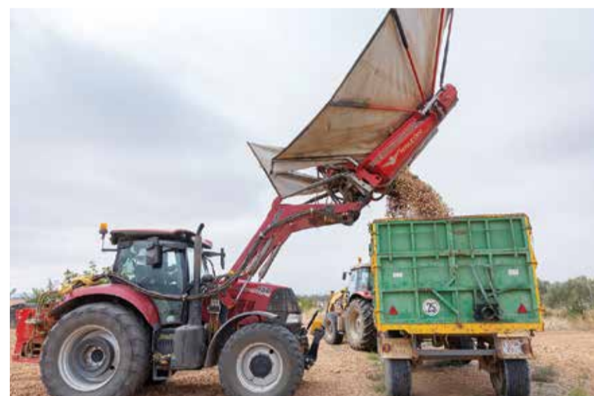
A farmer harvests pistachios in his farm in Manzanares.