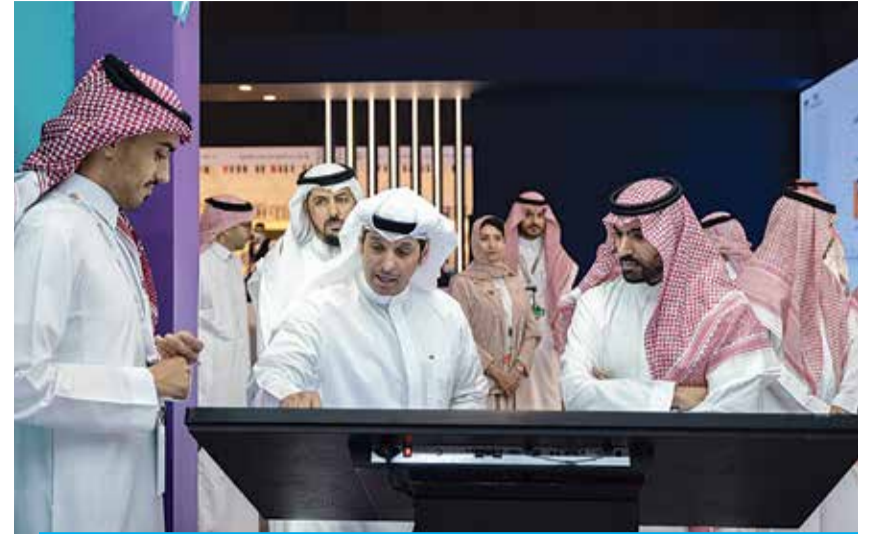
Kuwaiti and Saudi ministers browse the Riyadh International Book Fair with officials.