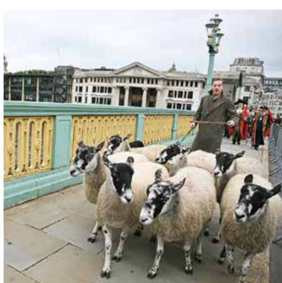
British actor Damian Lewis leads The Worshipful Company of Woolmen, driving sheep across Southwark Bridge, during the annual event in London.

Several of his ancestors as well as his brother also served as Lord Mayors of London, who are elected annually and run the governing body of the area. The sheep-driving event is part of a fundraiser for the wool trade's Woolmen Charity and the Lord Mayor's Appeal which aims to have an impact on "London's most pressing societal issues".