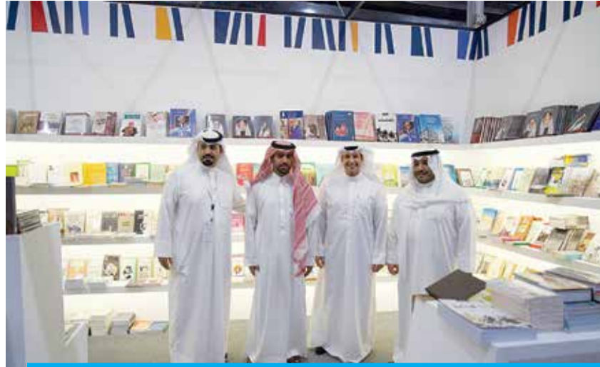
Kuwaiti Minister of Information and Culture Abdulrahman Al-Mutairi (center right) and Saudi Minister of Culture Prince Badr bin Abdullah (center left) pose at a pavilion for a Kuwaiti publishing house at the book fair.

EDITORIAL : 24833199-24833358-24833432 ADVERTISING : 24833199 Extn. 359 CIRCULATION : 24833199 Extn. 361 ACCOUNTS : 24833199 Extn. 125 P.O.Box 1301 Safat, 13014 Kuwait. Email: info@kuwaittimes.com Website: www.kuwaittimes.com