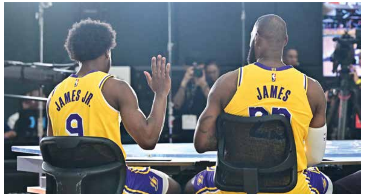
EL SEGUNDO: Los Angeles Lakers #23 LeBron James and his son #9 Bronny James attend the Lakers media day at UCLA Health Training Center in El Segundo, California, September 30, 2024.

James added that the gold medal win had fueled his hunger to play "meaningful basketball" again, four years after his last appearance in the NBA Finals in 2020. "It felt damn good to play meaningful basketball at the highest level," James said, describing hard-fought Olympic semi-final against Serbia