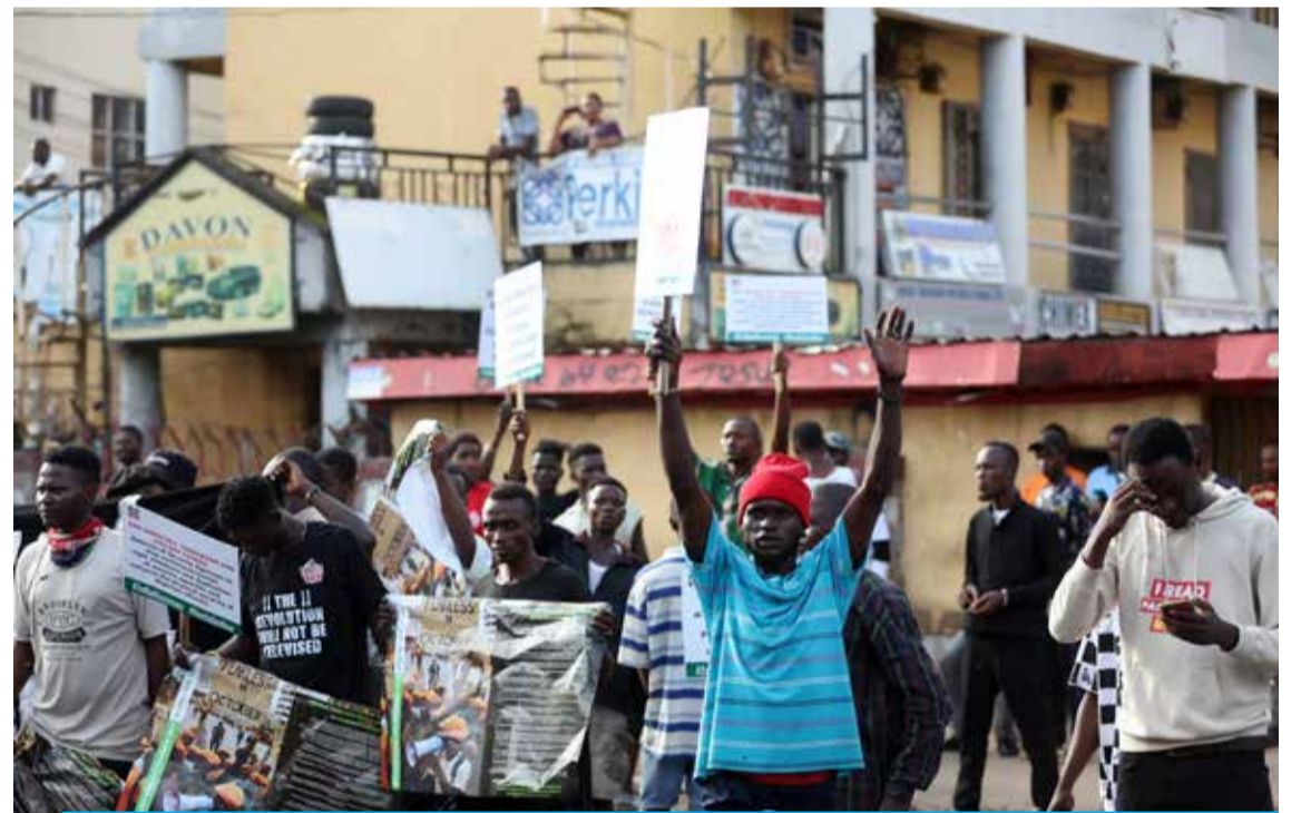
Protesters carry placards during the "Fearless In October" protest over bad governance in Abuja, Nigeria on October 1, 2024. — AFP

Bhutan saw around 100,000 foreign arrivals last year, part of the kingdom's efforts to protect its environment and culture from overtourism by levying a $100 daily charge to most visitors. — AFP