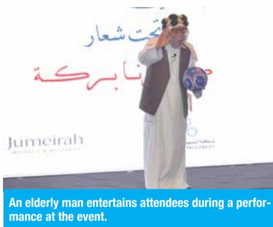
An elderly man entertains attendees during a performance at the event.

In a statement to KUNA, Minister Al-Huwailah noted one of this year's significant achievements: