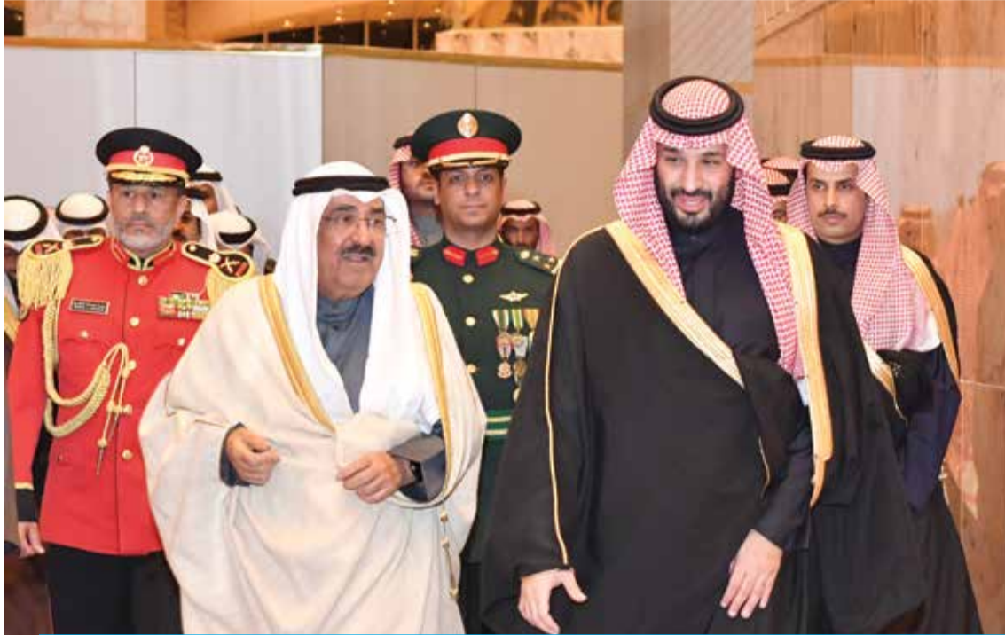
RIYADH: His Highness Sheikh Mishal Al-Ahmad Al-Jaber Al-Sabah is seen with Prince Mohammad bin Salman bin Abdulaziz Al Saud, the Crown Prince and Prime Minister of the Kingdom of Saudi Arabia, during the Amir's visit to Saudi Arabia in early 2024.

Guided by HH the Amir, Kuwait leads ambitious strategy to solidify global status