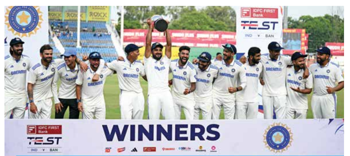
KANPUR: India’s players celebrate with their trophy at the end of the second Test cricket match between India and Bangladesh at the Green Park Cricket Stadium in Kanpur on October 1, 2024.

Off-spinner Ashwin broke through in the third over of the day when he had first-innings centurion Mominul Haque caught at leg slip by KL Rahul for two. Left-arm spinner Jadeja, who had taken his