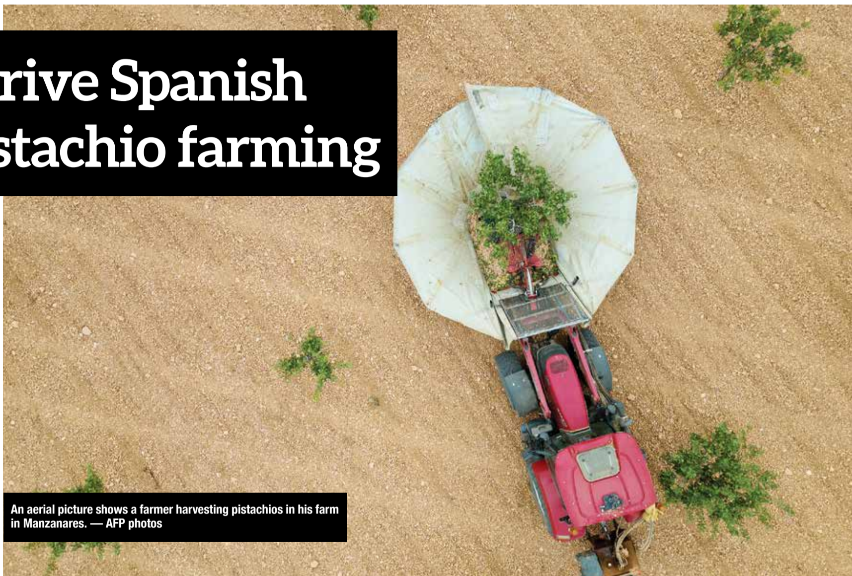
An aerial picture shows a farmer harvesting pistachios in his farm in Manzanares.