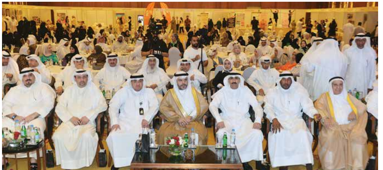
KUWAIT: Officials attend an event held by Ministry of Social Affairs to mark the International Day of Older Person on Monday, October 1, 2024.