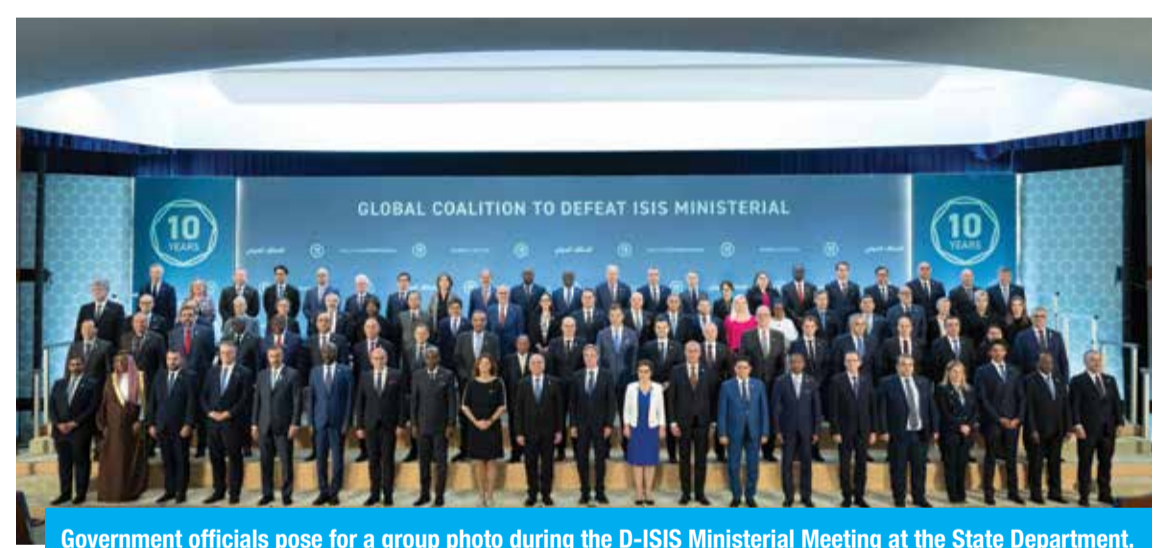
Government officials pose for a group photo during the D-ISIS Ministerial Meeting at the State Department.

The Cabinet saw a visual presentation by Minister of Finance, Minister of State for Economic and Investment Affairs and Acting Minister of Oil Noura Al-Fassam along with the National Committee of Anti-Money Laundering and Combating the Financing of Terrorism on reviewing Kuwait's achievements and future plans of Kuwait's efforts in the field over the period from October 2024 until October 2025. The Cabinet decided to task the committee with intensifying efforts and enhancing cooperation with governmental concerned bodies to meet international requirements of assessment in a manner that maintains Kuwait's position internationally. — KUNA