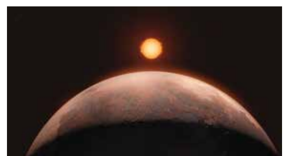
This handout artist's impression obtained on Oct 1, 2024 shows Barnard b, a sub-Earth-mass planet that was discovered orbiting Barnard's star.