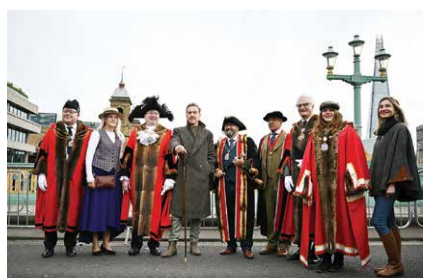
British actor Damian Lewis (fourth left) poses for a photograph with freemen of The City of London at the annual sheep drive on Southward Bridge by The Worshipful Company of Woolmen, in London.