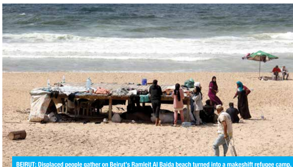
BEIRUT: Displaced people gather on Beirut's Ramleith Al Baida beach turned into a makeshift refugee camp, on Oct 1, 2024.

She and her daughter spent a night sleeping on the corniche, the seaside walk around central areas of Beirut that in peaceful times is a hub of