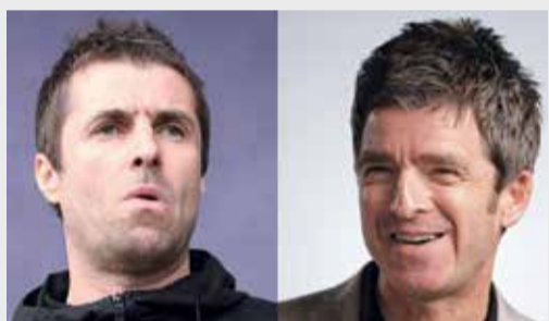
British singers Liam Gallagher (left) and Noel Gallagher. — AFP

They then flocked back to Belfast in recent days for the expected departure, which will see the ship head first to Brest, then Bilbao, the Azores, and across the Atlantic towards the Caribbean. The floating town, which can accommodate around 600 passengers, is due to visit all seven continents with more than 425 stops in 147 destinations planned. Port stays will last between two to seven days. — AFP