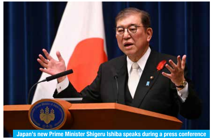
Japan's new Prime Minister Shigeru Ishiba speaks during a press conference at the prime minister's office in Tokyo on Oct 1, 2024.

But despite its troubles, the party which has ruled Japan for most of the post-war