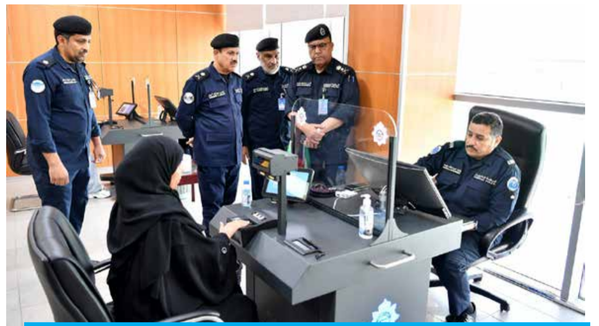
KUWAIT: A woman registers her biometrics at a designated interior ministry center in this file photo.

The Ministry of Interior has temporarily exempted students studying abroad on government scholarships and their companions, patients sent for treatment overseas, and diplomatic staff from the bio-