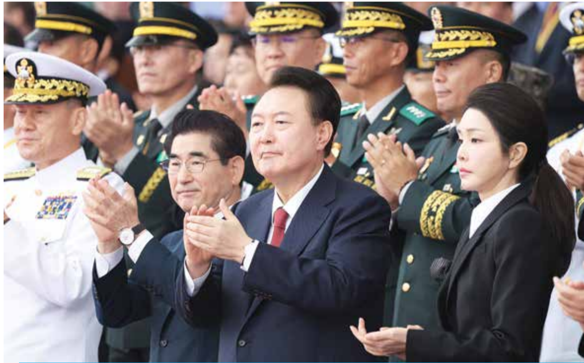
South Korean President Yoon Suk Yeol and his wife Kim Keon Hee attend a celebration to mark 76th anniversary of Korea Armed Forces Day in Seongnam on Oct 1, 2024.

Seoul unveils 'monster missile' at revived annual military parades