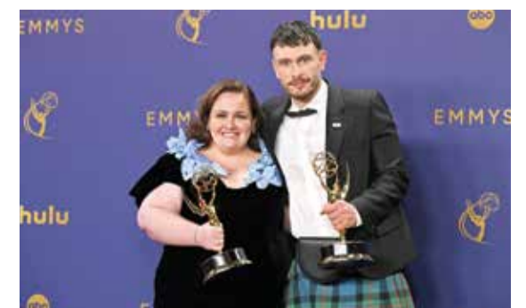
English actress Jessica Gunning (left) winner of the Outstanding Supporting Actress in a Limited or Anthology Series or Movie for “Baby Reindeer”, and actor Richard Gadd, winner of the Outstanding Limited or Anthology Series for “Baby Reindeer”, poses in the press room during the 76th Emmy Awards.