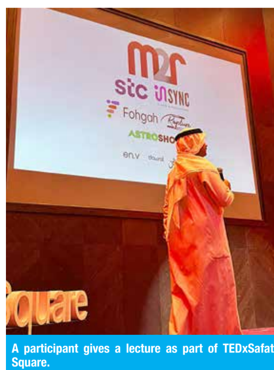
A participant gives a lecture as part of TEDxSafat Square.

AlJasem added: "Through partnering with platforms like TEDx, we aim to inspire and support the next generation by linking them with the tools and