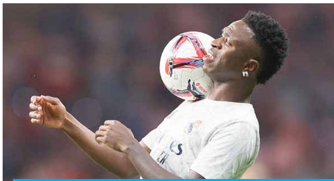
MADRID: Real Madrid's Brazilian forward Vinicius Junior warms up before the Spanish league football match between Club Atletico de Madrid and Real Madrid CF at the Metropolitano stadium in Madrid on September 29, 2024.

Madrid outplayed rivals Atletico Madrid on Sunday and Vinicius supplied Eder Militao's