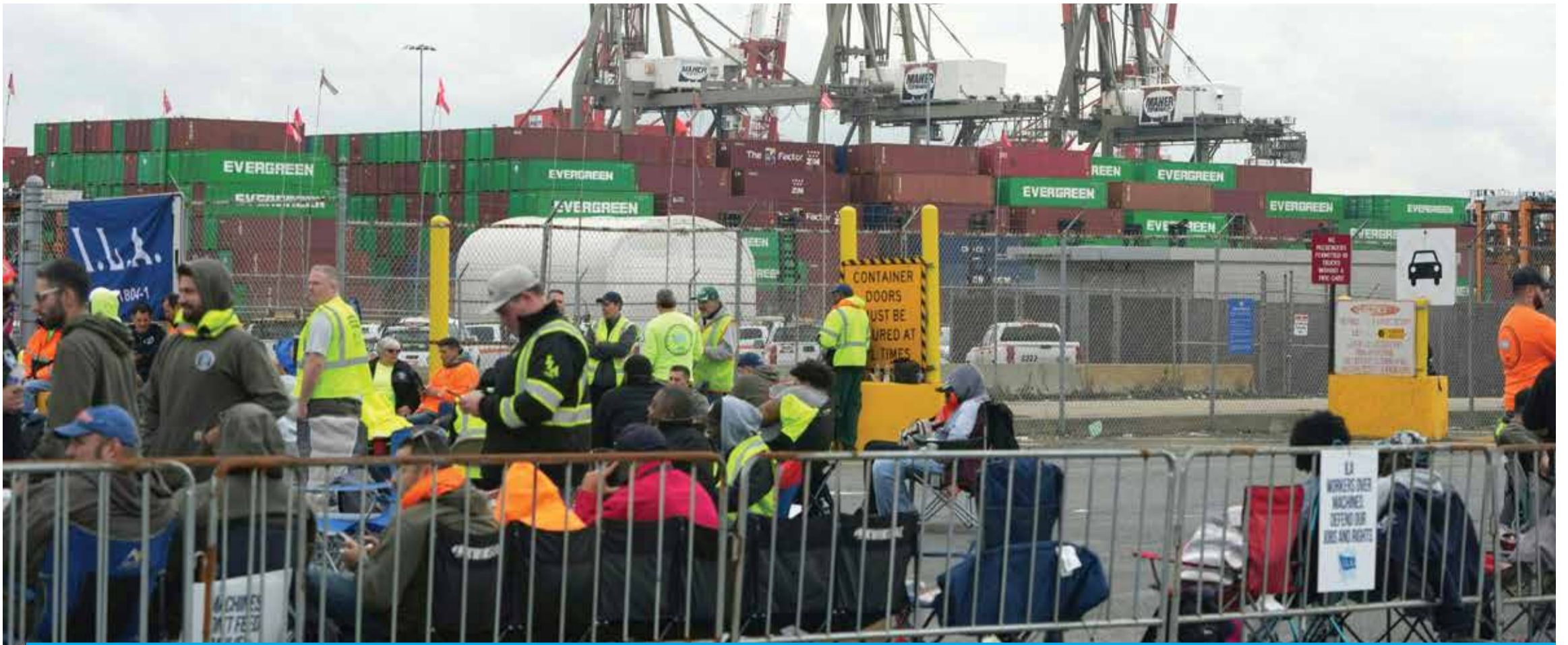
NEWARK, US: Dockworkers at the Maher Terminals in Port Newark are on strike on Oct 1, 2024 in New Jersey.

The first 'coast wide strike in almost 50 years' could drag on US economy