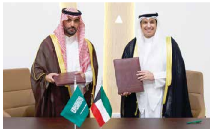
RIYADH: Kuwaiti Minister of Information and Culture Abdulrahman Al-Mutairi (right) and Saudi Minister of Culture Prince Badr bin Abdullah are seen during the signing of the memorandum.

KUWAIT: The European Union (EU) embassy in the State of Kuwait, in collaboration with the National Council for Culture, Arts and Letters (NCCAL), organized a special seminar on Monday, to mark the