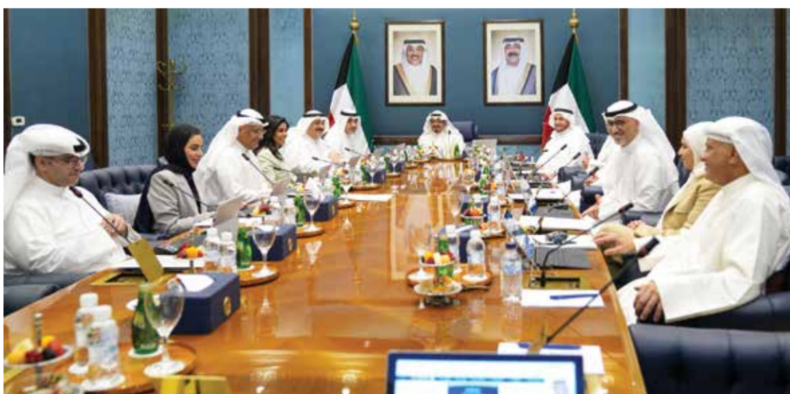
KUWAIT: Government officials during Kuwait's weekly Cabinet meeting.

Minister Al-Yahya noted that he held talks on the fringes of the meeting with Secretary Blinken on a range of main topics of common concern. In his inaugural speech to the ministerial meeting, Secretary Blinken announced that the United States earmarked $148 million to strengthening border security and counter-terrorism operations in the Sub-Saharan Africa and Central Asia, in addition to $168 million allocated to the stabilization of Iraq and Syria. — Agencies