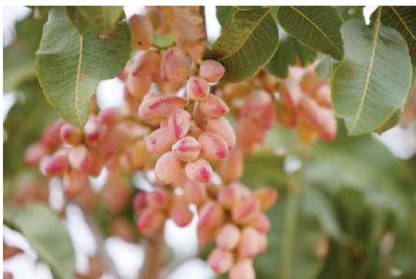
A picture shows pistachios on a tree in a farm on the outskirts of Manzanares.