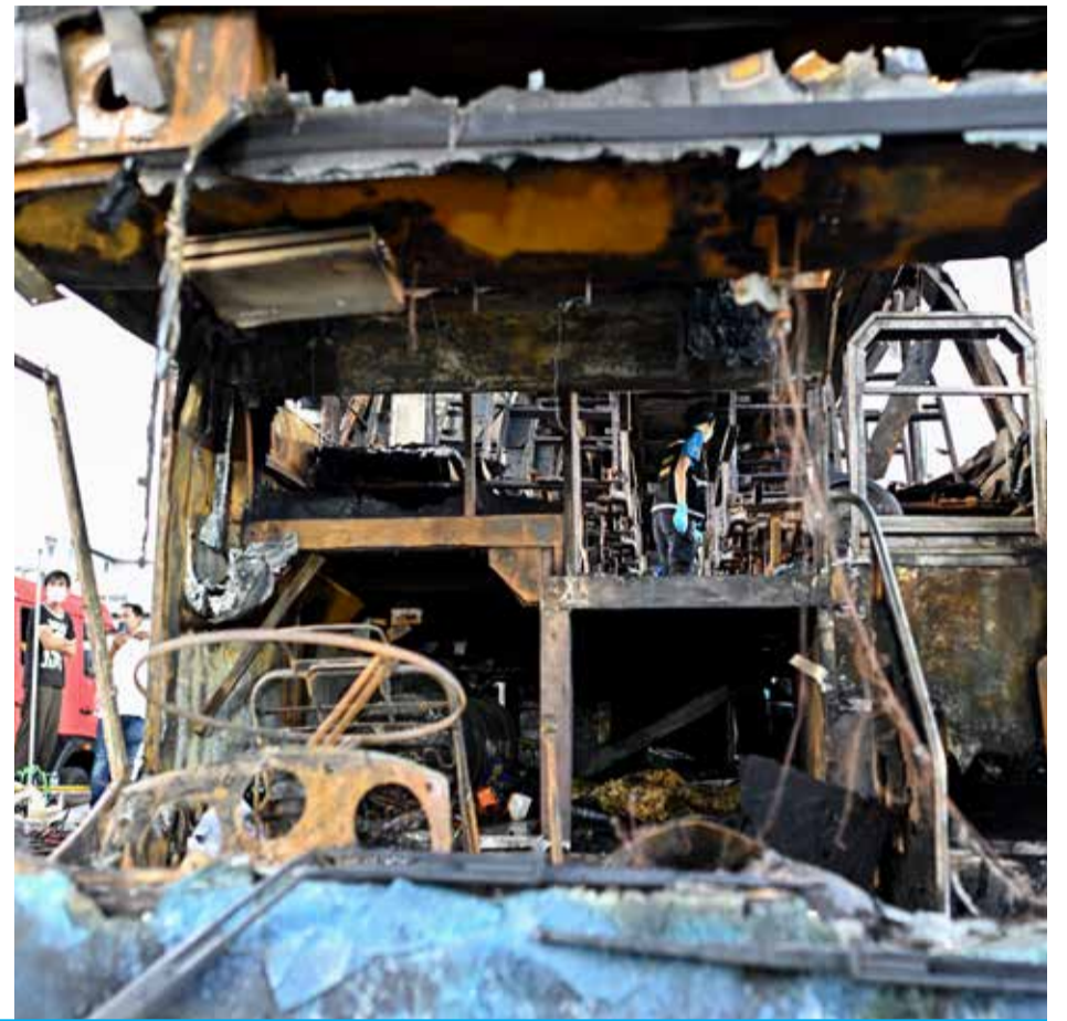
BANGKOK: A relative of a student covers the eyes of a girl as they walk past the wreckage of the bus on the outskirts of Bangkok on Oct 1, 2024. (Right) A police officer inspects the wreckage of the burnt-out bus.