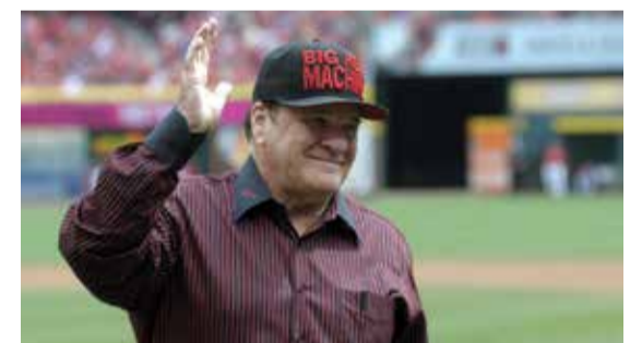
CINCINNATI: Pete Rose acknowledges the crowd during a ceremony at Great American Ball Park on September 12, 2015 in Cincinnati, Ohio.

He won the season batting titles in 1968, 1969 and 1973, when he also claimed the National League Most Valuable Player award. Ten years earlier, Rose had been named the NL Rookie of the Year.