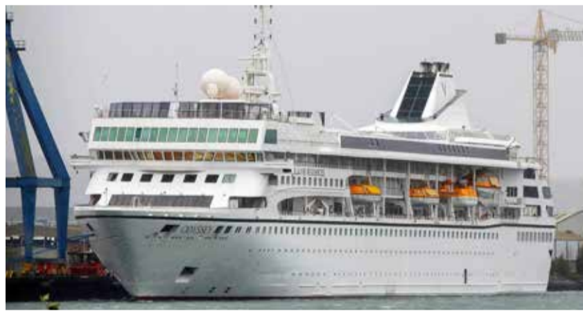
Villa Vie Residences’ ‘Odyssey’ cruise ship, docked at the Harland &amp; Wolff ship repair dock in Belfast.