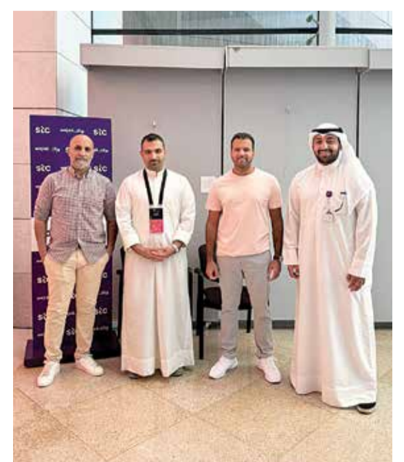
KUWAIT: stc team members pose for a photo with winners of the first edition of InspireU.

TEDxSafat Square, an independently organized TED event, is known for bringing together a powerful blend of pre-recorded TED Talks and inspiring