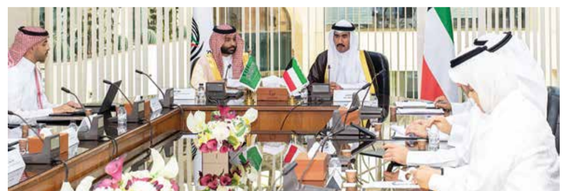
KUWAIT: Kuwaiti and Saudi officials are seen during their meetings to discuss cooperation in housing, public works projects.