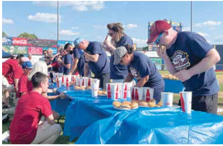
Competitors take part in a meat roll competitive eating contest in Trenton, New Jersey.