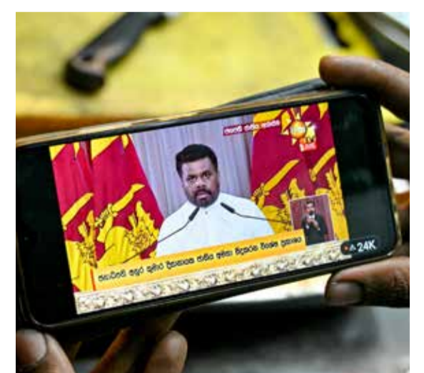
COLOMBO: A vendor watches a live telecast as Sri Lanka's newly elected President Anura Kumara Dissanayake addresses the nation at Galle Face Beach in Colombo.

His successor Wickremesinghe secured the IMF