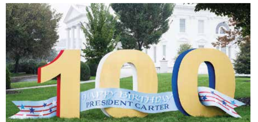
WASHINGTON: A sign on the North Lawn of the White House wishes a "Happy Birthday" to former US President Jimmy Carter as he turns 100 on Oct 1, 2024.