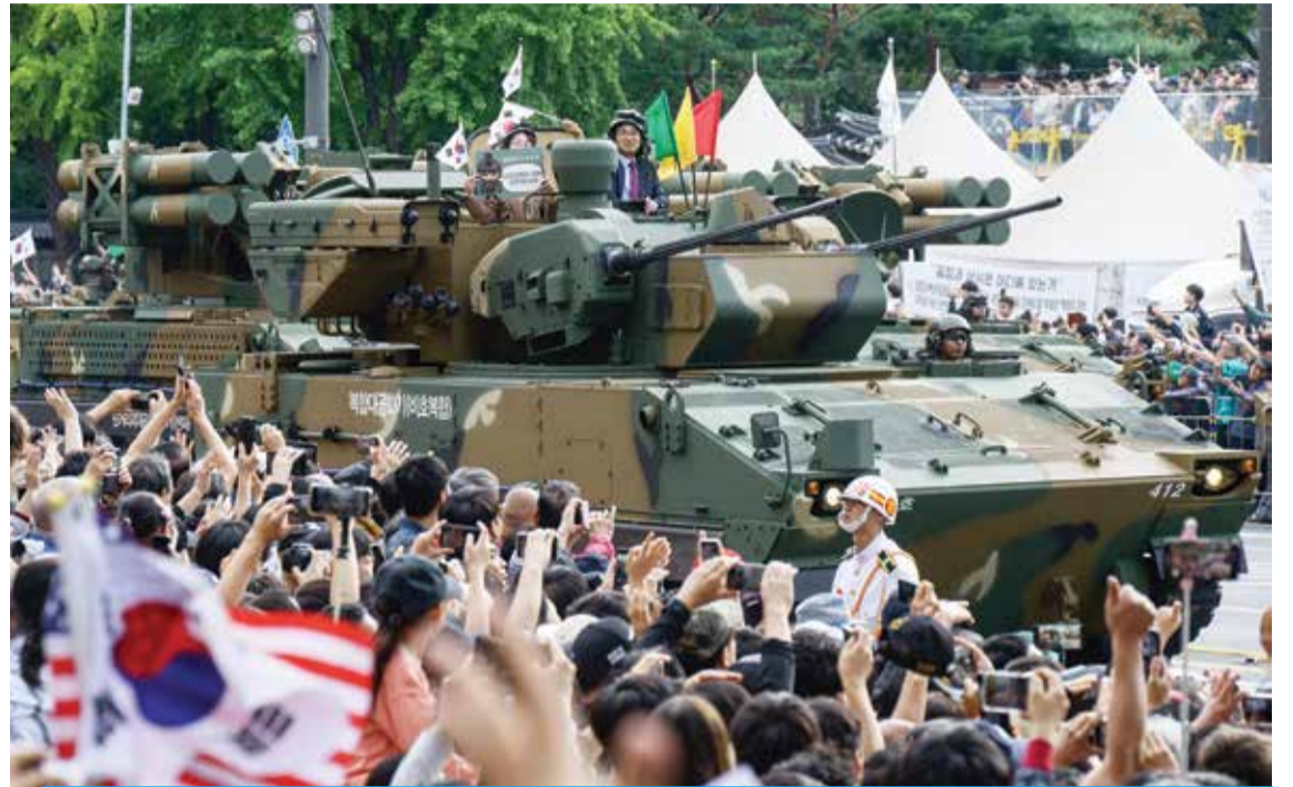
Military vehicles are seen during a parade to celebrate South Korea's 76th Armed Forces Day in Seoul on Oct 1, 2024.

SEOUL: North Korea's Kim Jong Un would face the end of his regime if he used his nuclear weapons against the South, its president said Tuesday, as Seoul staged a parade showcasing its military prowess.