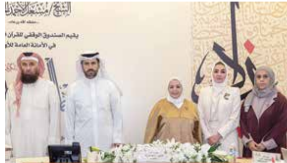
KUWAIT: Public Awqaf Foundation officials pose for a photo.

New agreement to foster collaboration in art, literature, heritage preservation