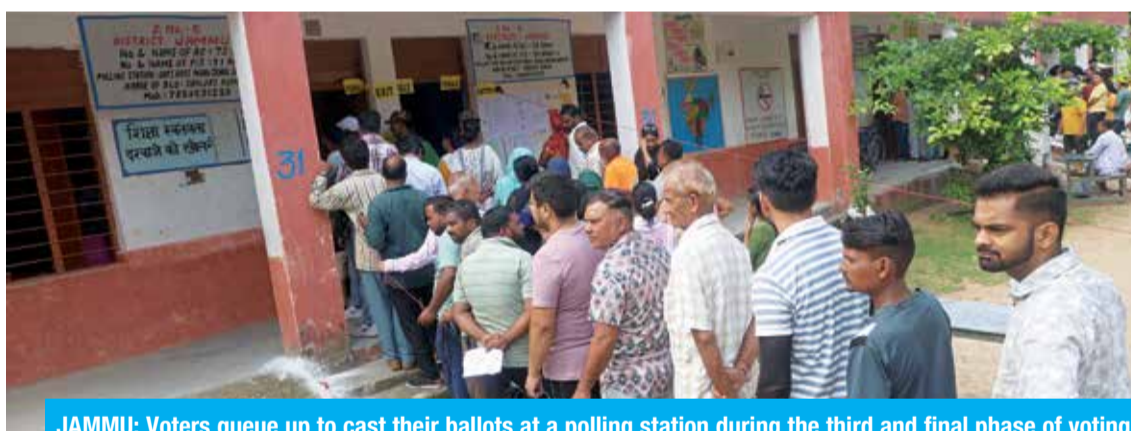
JAMMU: Voters queue up to cast their ballots at a polling station during the third and final phase of voting for local assembly elections in Jammu on Oct 1.

The body found on Monday was wearing a gym suit with a tag that rescuers believed says "Kiso", a local