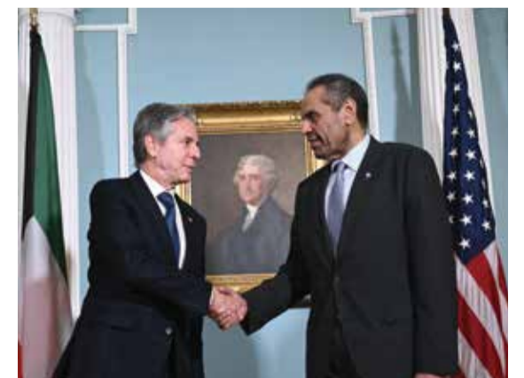
WASHINGTON: US Secretary of State Antony Blinken (left) meets with Kuwaiti Foreign Minister Abdullah Al-Yahya at the Department of State in Washington, DC, September 30, 2024.

The United States had announced last month that the coalition mission in Iraq will come to a close in September 2025, but emphasized that troops will stay in the country and that the counter-ISIS mission will continue. The US and Iraq agreed on a two-phase transition plan for operations in Iraq with the first phase beginning in September and ending the same month next year. The second phase involves