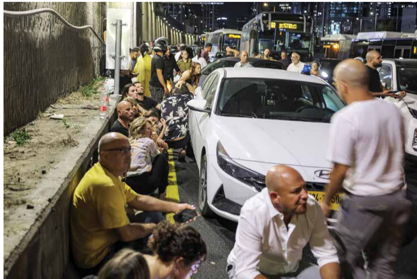
TEL AVIV: Zionists take cover behind vehicles under a bridge along the side of a highway on Oct 1, 2024.

Zionist forces enter Lebanon • Hezb targets Mossad HQ • 4 killed in Tel Aviv • 37 martyred in Gaza