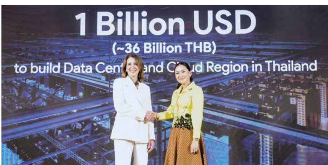
Thailand's Prime Minister Paetongtarn Shinawatra (right) shakes hands with Ruth Porat (left), president and chief investment officer of Google and its parent company Alphabet during a meeting at the government house in Bangkok.