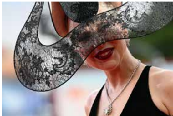
Actress and singer Lady Gaga attends the red carpet of the movie 'Joker: Folie a deux' presented in competition during the 81st International Venice Film Festival at Venice Lido.

Lady Gaga creeps through the Paris Museum at night in a red wig singing a song composed specially for the video, which was released on her Instagram and TikTok accounts. She ends up nose-to-nose with the Mona Lisa before painting a clownish smile in lipstick on the pro-