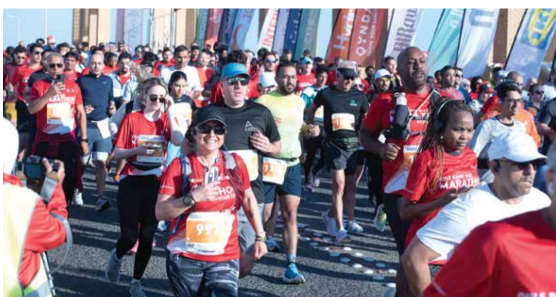
The previous edition of the GB Marathon.