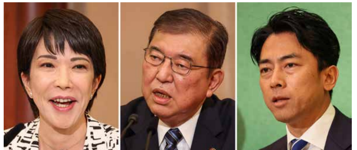
TOKYO: This combination of file photos shows (from left) Economic Security Minister Sanae Takaichi, former defence minister Shigeru Ishiba and former environment minister Shinjiro Koizumi, three of the nine candidates running for Japan's ruling Liberal Democratic Party's (LDP) presidential election.

LDP presidents are in office for three years and can serve up to three straight terms. Unpopular Prime Minister Fumio Kishida is not running for re-election. With the