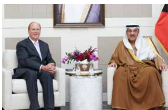
Representative of His Highness the Amir, His Highness the Crown Prince, receives Chairman and Chief Executive Officer of BlackRock Company Larry Fink.