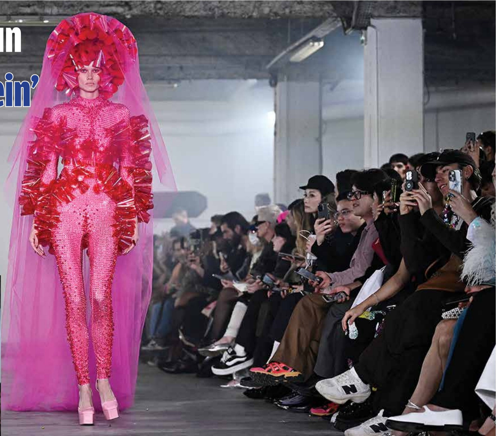
Models present creations by Germanier for the Women Ready-to-wear Spring-Summer 2025 collection as part of the Paris Fashion Week in Paris on September 24, 2024.