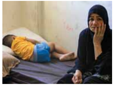
Zionist bombing displaces 90,000 people in Lebanon