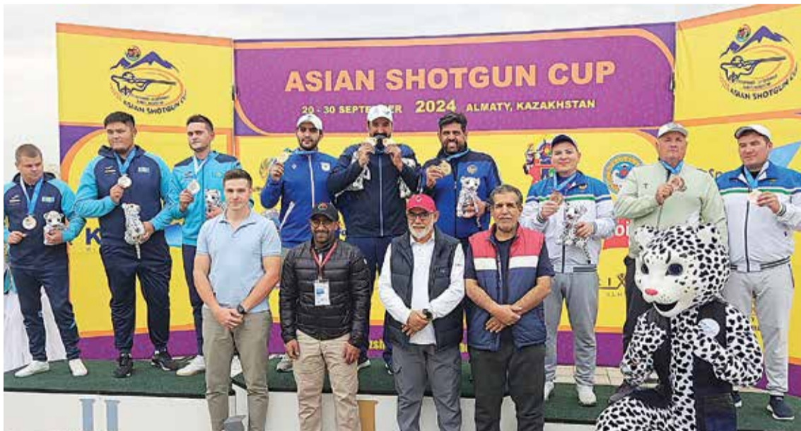
ALMATY: The winners at the Asian Shotgun Cup 2024.

The match has been switched to Newcastle's St. James Park on October 1. Newcastle have contributed £15,000 to a fund to help repair the pitch at Cherry Red Records Stadium. Manchester United and Tottenham were among the sides to progress to round four last week. Liverpool take on West Ham and Arsenal host Bolton in the remaining two ties on Wednesday. — AFP