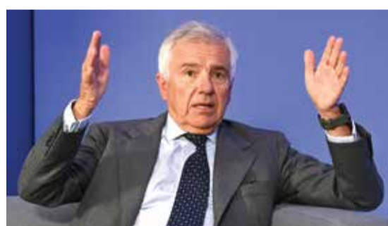
BUDAPEST: Spanish sports executive and financial analyst, the vice president of the International Olympic Committee (IOC) Juan Antonio Samaranch Junior gives an interview to AFP in Budapest.

"We didn't take sides... The minute we take sides, you are excluding the other side, a part of the world," Samaranch said. He promised to fight for the Olympic movement's "independence and universality" without which the IOC "would not serve" its purpose to "unite despite differences, despite controversies, despite fights, despite war". Russia was banned from world sport following the invasion of Ukraine in February 2022. A tiny squad of 15 neutral athletes represented Russia for the Paris Olympics this summer. Comment-