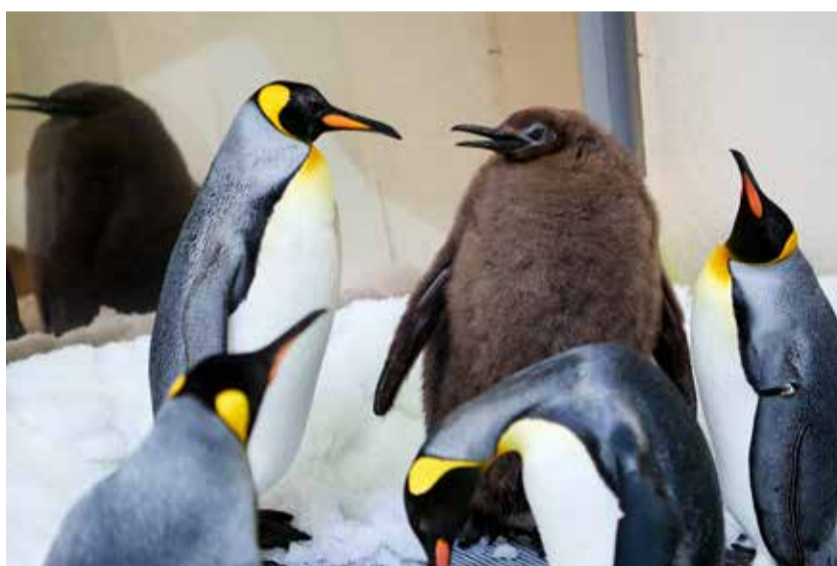
A handout photo taken by Sea Life Melbourne and released on September 25, 2024 shows Pesto, a nine-month-old penguin chick, in Melbourne. — AFP

Pesto's coat is mostly "dense" feathers, Thornton said, which penguin chicks require to keep warm against freezing Antarctic temperatures. His big size is also an advantage because smaller chicks are at risk of being eaten by predatory birds in the wild. Genetics also play a part -- his ancestors were some of the biggest and oldest penguins the aquarium has housed. "He is really healthy," Thornton