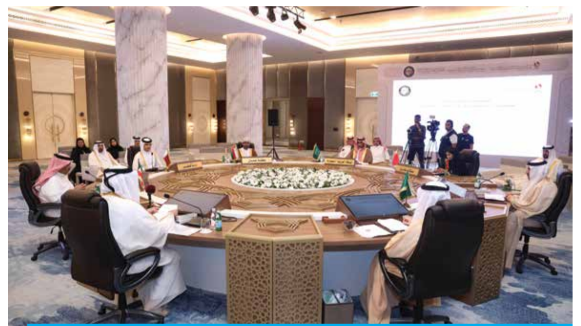
The 30th Meeting of the Committee of Undersecretaries of the Ministries of Post and Telecommunications in GCC.