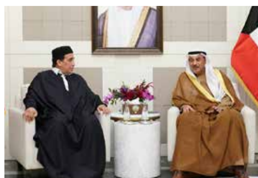
Representative of His Highness the Amir, His Highness the Crown Prince, received the President of Libya's Presidential Council Mohamed Al Menfi on Tuesday.