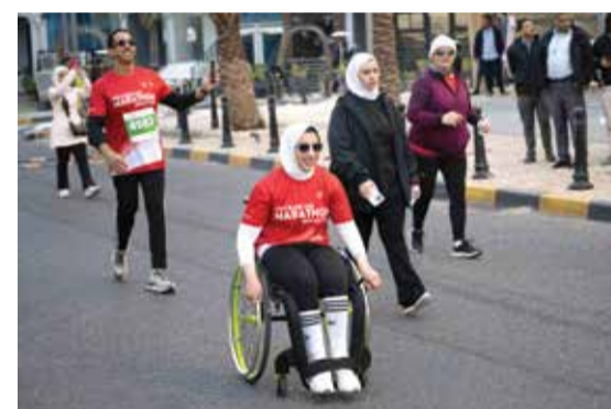
Distinguished participation of people with disabilities in the previous edition.

social, and governance (ESG) dimensions. The Bank remains committed to implementing strategically selected sustainability programs both internally and externally to advance these objectives.