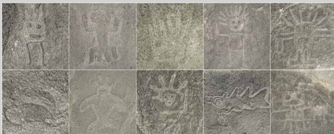
A combination of undated handout picture released by the Yamagata University Institute of Nasca shows 10 of 303 new geoglyphs discovered by scientists at Yamagata University in Japan, where a team of researchers applied AI-assisted image analysis of aerial photographs, which accelerated the pace of geoglyph discovery during a 6-month fieldwork in the Nazca Pampas.

"The traditional method of study, which consisted of visually identifying the geoglyphs from high-resolution images of this vast area, was slow and carried the risk of overlooking