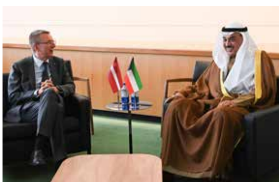
Representative of His Highness the Amir Sheikh Mishal Al-Ahmad Al-Jaber Al-Sabah, His Highness the Crown Prince Sheikh Sabah Al-Khaled Al-Hamad Al-Sabah, received Latvian President Edgars Rinkevics on Tuesday.