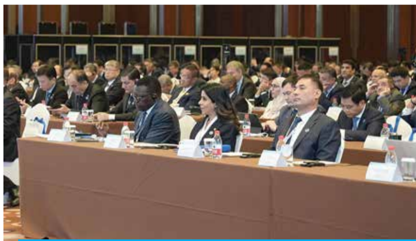
Minister of Public Works Dr Noura Al-Mashaan at the Global Sustainable Transport Forum held in Beijing.