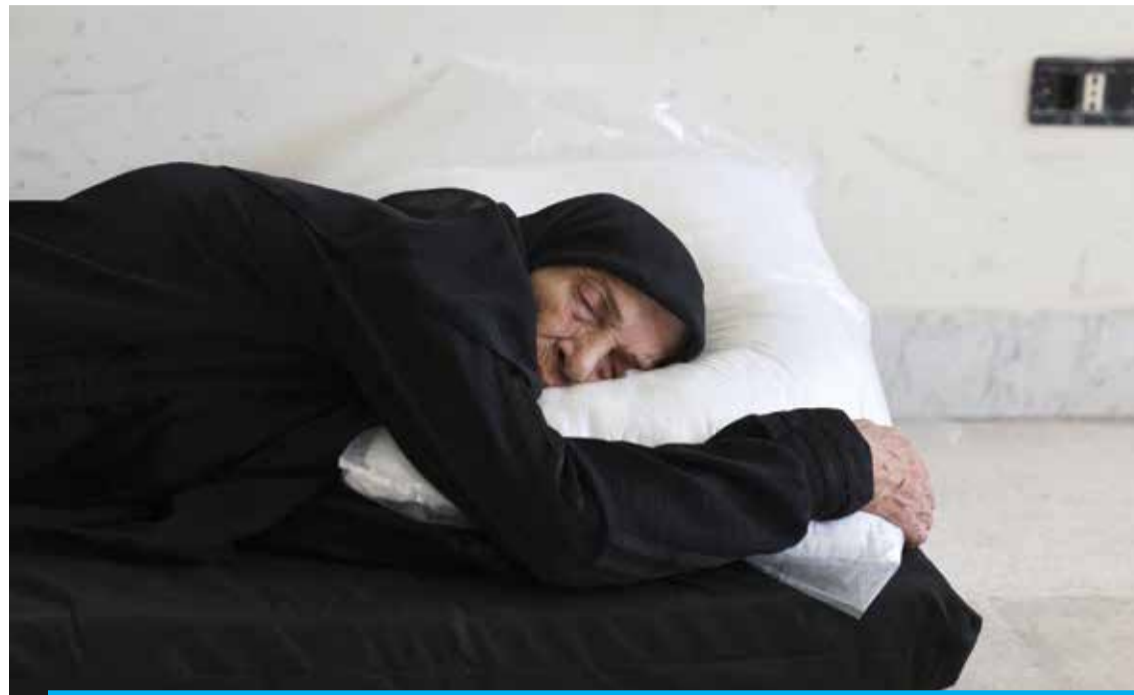
BEIRUT: An elderly woman, who fled her village in southern Lebanon, takes refuge at a school turned temporary shelter in the capital Beirut on September 24, 2024.

Some people "spent the night on the streets, like my sisters and my wife's sisters", he added. It was not the first he and his family have fled their homes, but this time was different, he said. "I was displaced for around 20 days" in 2006 when the Zionist entity and Hezbollah last went to war, he said, "but that war