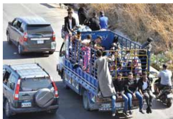
NAAMEH: People sit with their belongings in the back of a truck as they arrive in the coastal town of Naameh, south of Lebanon's capital Beirut on September 24, 2024, as they flee their homes in southern Lebanon.

A new front in Lebanon "will put much more strain on us. The needs will increase and we will also need more support from the donors," the UNRWA chief added. The agency saw a series of funding cuts earlier this year after the entity accused more than a dozen of its 13,000 Gaza employees of involvement in the October 7 attack by Hamas. Most donors have since resumed funding with the exception of the United States, UNRWA's largest