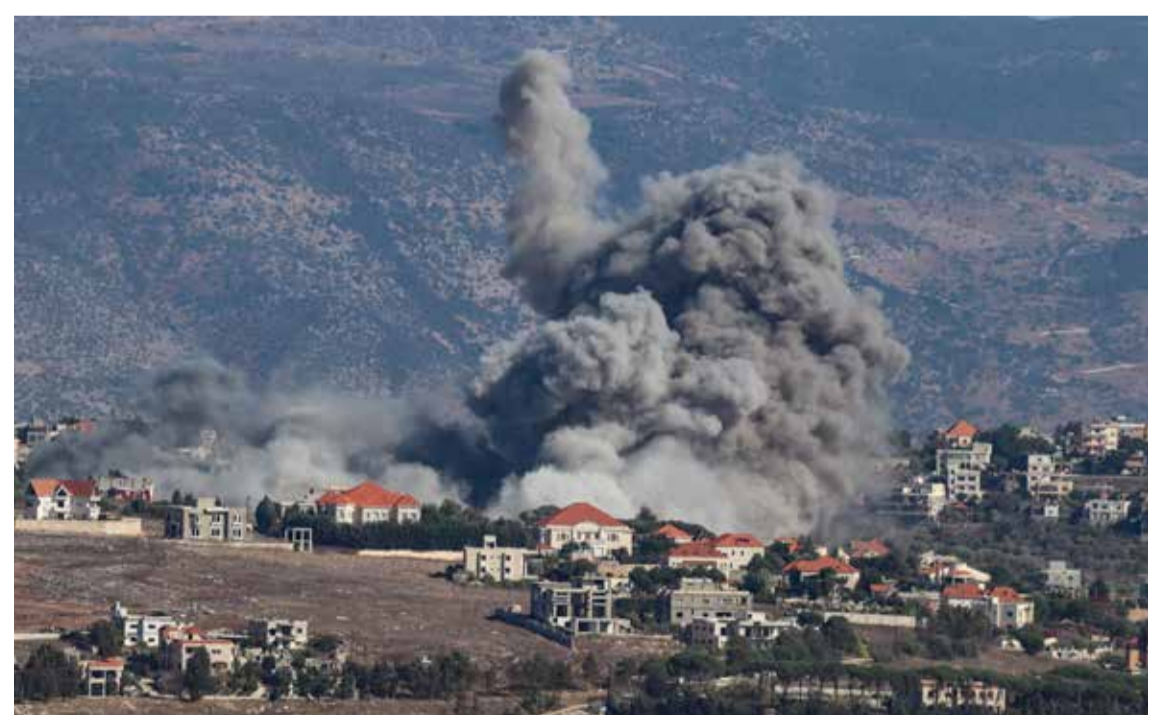
KHIAM, Lebanon: Smoke rises from the site of a Zionist airstrike that targeted this southern Lebanese village on Sept 25, 2024.

The United Nations Security Council said it would hold an emergency meeting on the crisis in New York, while UN Secretary-General Antonio Guterres warned the situation was critical. The UN's International Organization for Migration on Wednesday said 90,000 people had been displaced in Lebanon since Monday. Among them, "many of the more than 111,000 people displaced since Octo-