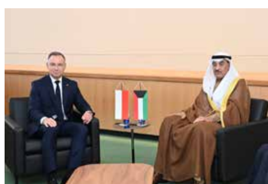
Representative of His Highness the Amir, His Highness the Crown Prince, held talks with Polish President Andrzej Duda on Tuesday.