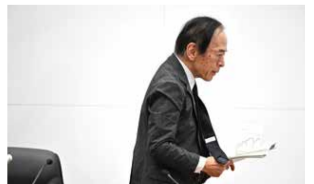
Bank of Japan (BoJ) governor Kazuo Ueda leaves a press conference at BoJ headquarters after a monetary policy meeting in central Tokyo.

By injecting liquidity, the PBOC provides more room for the government to issue debt for any extra stimulus, Neumann said. "What the market is hoping for is that the liquidity injections signal a potential announcement in the coming weeks for a big bond issuance program," he added.