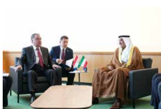
Representative of His Highness the Amir, His Highness the Crown Prince Sheikh Sabah Al-Khaled Al-Hamad Al-Sabah, received Tajikistan President Emomali Rahmon on Tuesday.