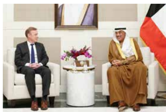
NEW YORK: Representative of His Highness the Amir Sheikh Mishal Al-Ahmad Al-Jaber Al-Sabah, His Highness the Crown Prince Sheikh Sabah Al-Khaled Al-Hamad Al-Sabah, received US National Security Agency Advisor Jake Sullivan on Tuesday.