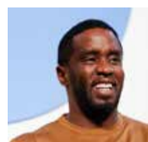
Sean "Diddy" Combs

A spate of separate lawsuits, now including Graves's, in the last year have painted the picture of a serial predator, sparking a massive fall from grace for the hip hop star. "It goes beyond just physical harm caused by and during the assault. It's a pain that reaches into your very core of who you are, and leaves emotional scars that will never be fully healed," she told reporters.