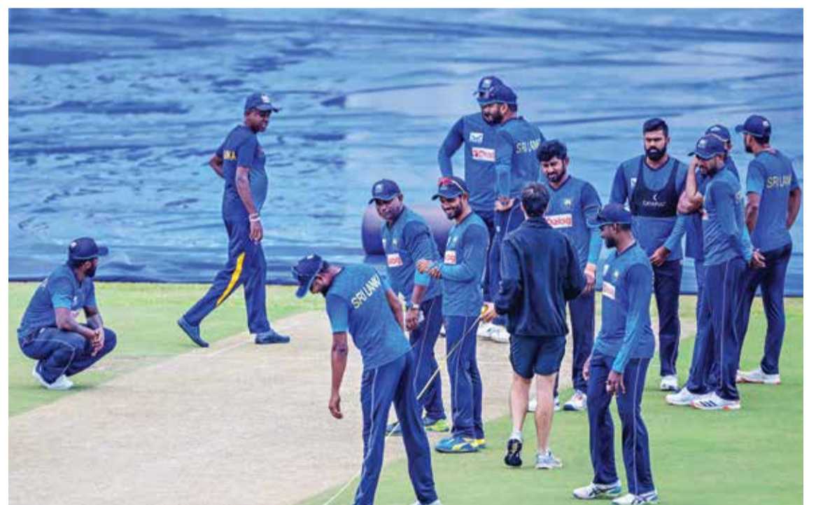
GALLE: Sri Lanka's head coach Sanath Jayasuriya (4L) along with players inspect the pitch during a practice session on the eve of their second Test cricket match against New Zealand at the Galle International Cricket Stadium in Galle on September 25, 2024.

Earlier, wicketkeeper Carey followed his 74 in the second ODI at Leeds, with another fine innings after England reduced Australia to 132-4 on Tuesday. All-rounder Green, in for the injured Travis Head, had previously fallen for 42 and next over Australia's 131-3 became 132-4 when Marnus Labuschagne was out for a duck after a miscued paddle-sweep off spinner Jacks lobbed gently to wicketkeeper Jamie Smith. Australia's Smith was out when a fierce pull off Archer was superbly caught by a diving Brydon Carse on the boundary.