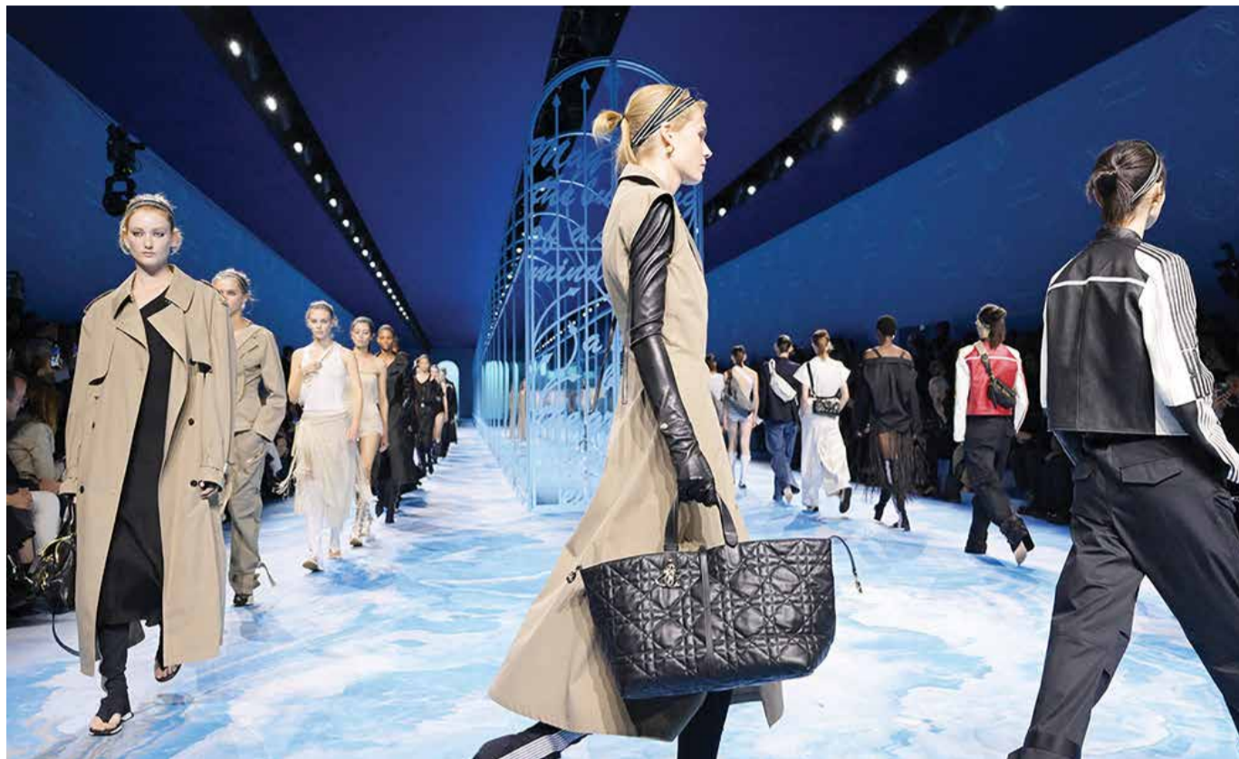
Models walk on the catwalk after the presentation by Dior for the Women Ready-to-wear Spring-Summer 2025 collection as part of the Paris Fashion Week, in Paris.