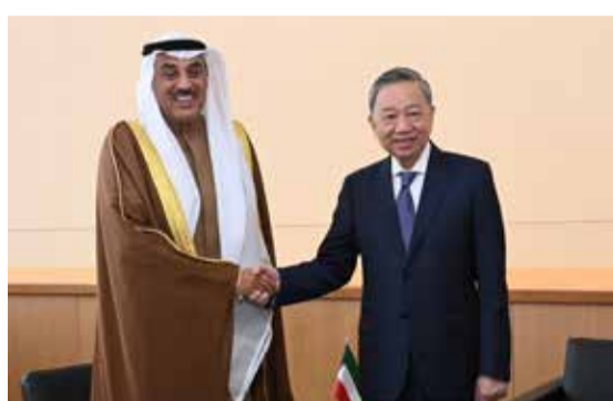
Representative of His Highness the Amir, His Highness the Crown Prince Sheikh Sabah Al-Khaled Al-Hamad Al-Sabah, received Vietnamese President To Lam on Tuesday.