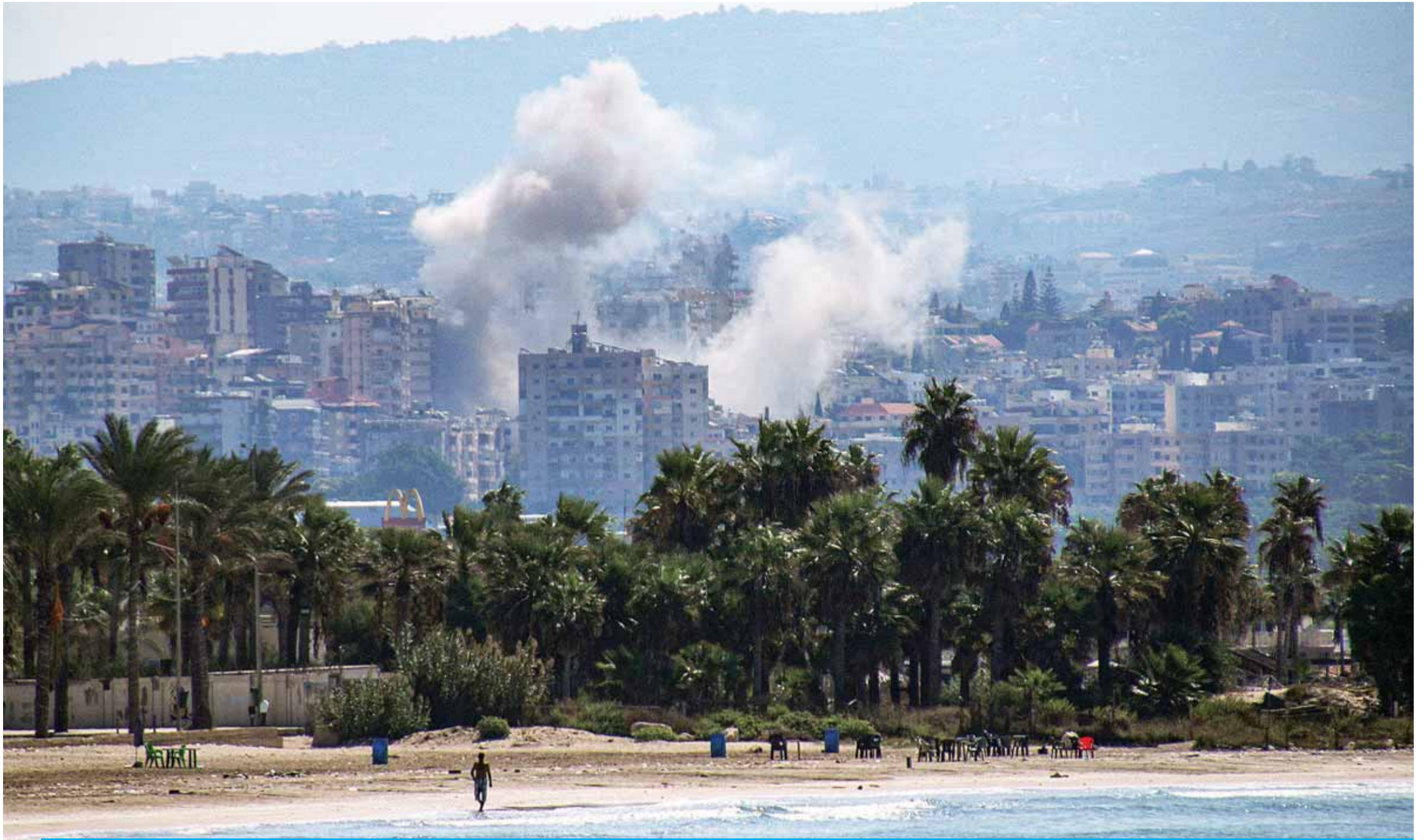
TYRE: A cloud of smoke erupts during Zionist air strikes on a village south of Tyre in southern Lebanon on September 25, 2024.