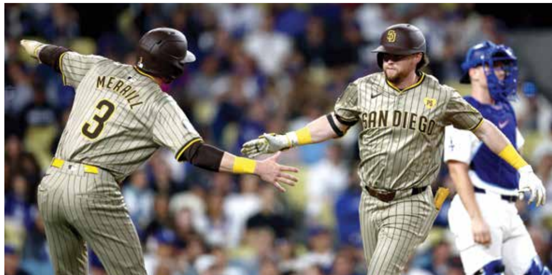
LOS ANGELES: Jake Cronenworth #9 of the San Diego Padres celebrates his two run home run with teammate Jackson Merrill #3 during the second inning against the Los Angeles Dodgers.

Andrew Benintendi capped a three-run eighth inning with a go-ahead single as host Chicago edged Los Angeles to end a five-game losing streak. Handcuffed by Angels rookie right-hander Jack Kochanowicz for seven innings, Chicago rallied to remain tied with the 1962 New York Mets for the most losses in a single season in modern major league history. It was Chicago's first win this year when trailing after seven innings. Kochanowicz limited the White Sox to three singles and no runs. Angels second baseman Jack Lopez hit his first major league homer.