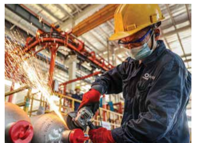
A worker polishes newly-produced gas cylinders at a factory in Ruichang, in central China's Jiangxi province on September 25, 2024.

"If Takaichi wins, the initial market reaction would be a yen fall as markets price in the chance of delay in future rate hikes," said Naomi Muguruma, chief bond strategist at Mitsubishi UFJ Morgan Stanley Securities.