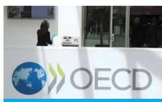
PARIS: A participant stands at the OECD headquarters in Paris.

While it raised the world GDP outlook, the OECD sounded the alarm on rising debt, urging governments to make "stronger efforts" to contain spending and raise revenue. "Decisive fiscal actions are needed to ensure debt sustainability, preserve room for governments to react to future shocks and generate resources to help meet future spending pressures," it said. "Governments face significant fiscal challenges from higher debt and the additional spending pressures arising from ageing populations, climate change mitigation and adaptation measures, plans to raise defence spending, and the