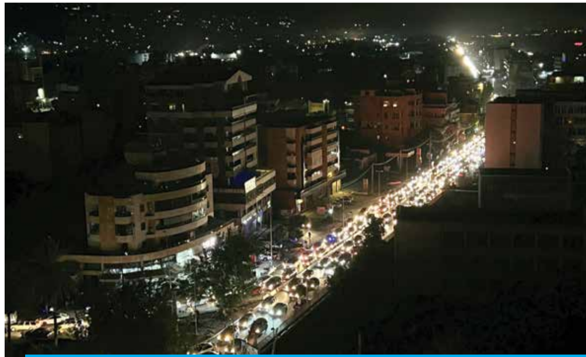
SIDON: A traffic jam clogs up a street in the Lebanese city of Sidon on September 23, 2024, as people flee their homes in southern Lebanon.

Some take refuge in shelters, others sleep on the streets after long trips fleeing attacks