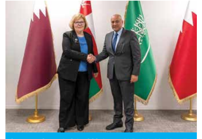
Secretary General of the GCC Jasem Al-Budaiwi holds talks with US Assistant Secretary of State for Near Eastern Affairs Barbara Leaf.

NEW YORK: Secretary General of the Gulf Cooperation Council (GCC), Jasem Al-Budaiwi, on Tuesday, praised the prominent humanitarian and relief role of the United Nations Relief and Works Agency for Palestine Refugees in the Near East (UNRWA). This came during his reception of the Commissioner-General of UNRWA Philippe Lazzarini on the sidelines of his participation in the 79th session of the United Nations General Assembly in New York, at the GCC Mission to the United Nations.