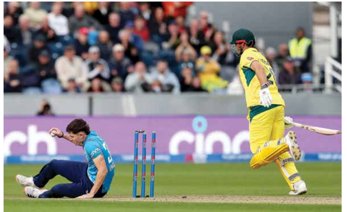
CHESTER-LE-STREET: England's Matthew Potts (L) catches the ball to take the wicket of Australia's Aaron Hardie during the third One Day International (ODI) cricket match between England and Australia, at Chester-le-Street in County Durham, northern England on September 24, 2024.

The pitch at Kanpur's Green Park stadium is