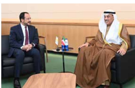
Representative of His Highness the Amir, His Highness the Crown Prince, met Cypriot President Nikos Christodoulides on Tuesday.