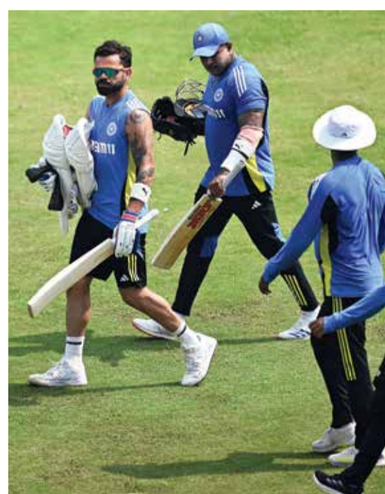
KANPUR: India's Virat Kohli (L) arrives for a practice session at the Green Park Cricket Stadium in Kanpur on September 25, 2024, ahead of their second cricket Test match against Bangladesh.

A talented player with ball in hand, Libbok has often failed from the tee at Test level, though, and vastly experienced playmaker Handre Pollard was expected to start against Los Pumas. Erasmus backed Libbok, saying "the general play of Manie is fantastic, and he brings a lot of energy and play-making abilities to the backline. He dictates play well, so we back him fully to do the job for us at fly-half."