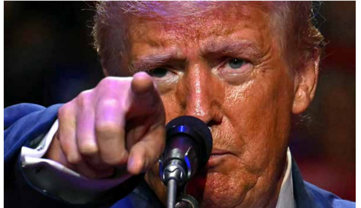
INDIANA: Former US President and Republican presidential candidate Donald Trump gestures as he speaks during a campaign rally at Ed Fry Arena in Indiana, Pennsylvania, on September 23, 2024.

The US agencies said the Iranian cyberattackers had also attempted to share the information stolen from the Trump campaign with US media