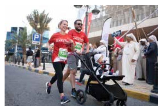
An open invitation to everyone to participate in a special sports day.

Aligned with Kuwait Vision 2035, "New Kuwait," and its focus on fostering collaborative partnerships, Gulf Bank is actively engaged in driving comprehensive sustainability initiatives across environmental,