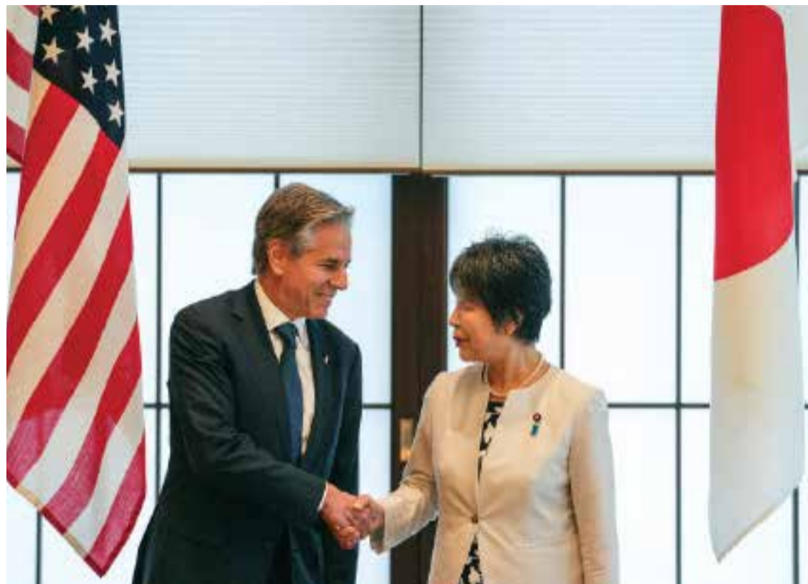
TOKYO: US Secretary of State Antony Blinken (left) shakes hands with Japan's Foreign Minister Yoko Kamikawa during their meeting at the Iikura Guest House in Tokyo on July 28, 2024.

For the first time, the ministers also discussed "extended deterrence", a term used to describe the US commitment to use its nuclear forces to deter attacks on allies. It is sensitive subject in Japan, which