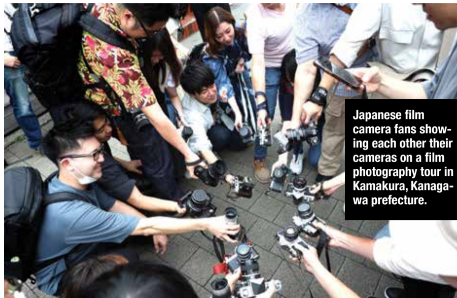
Japanese film camera fans showing each other their cameras on a film photography tour in Kamakura, Kanagawa prefecture.