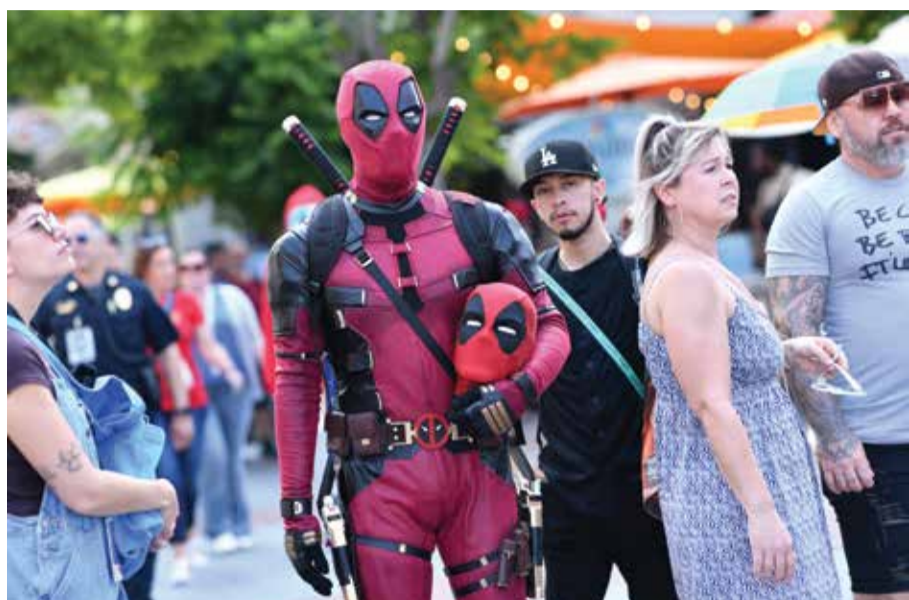
A Deadpool cosplayer walks outside the convention center.