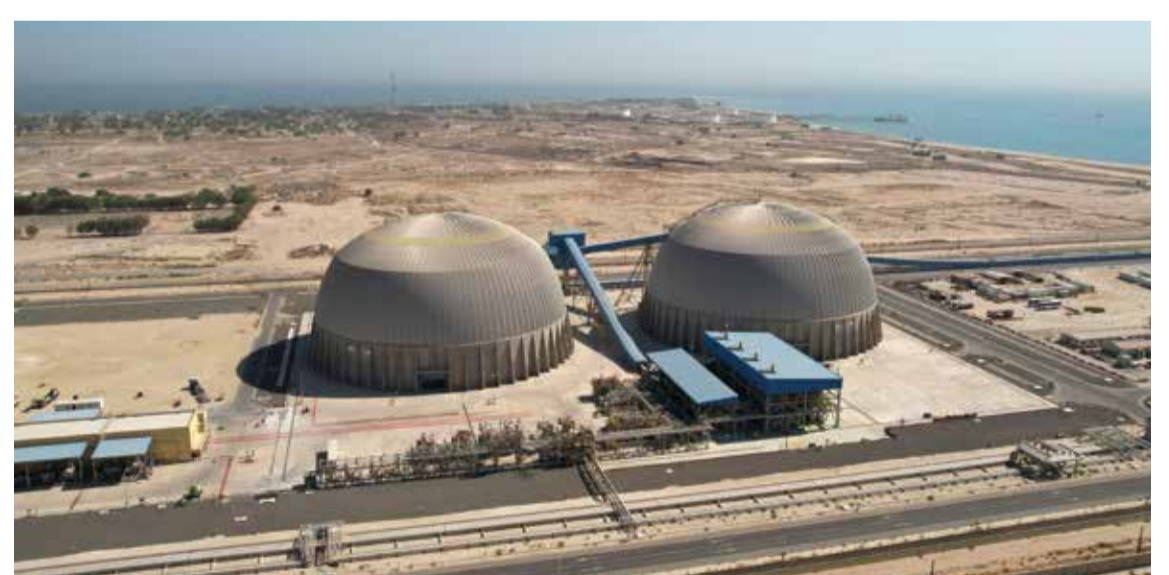
KUWAIT: Photo provided by the Al-Zour Refinery shows a view of the facility, in Al-Zour, south of Kuwait City. — AFP

It remains within the limits of what is possible. But only prudent management makes the difference, and its prudence indicators are weak. The Central Statisti-