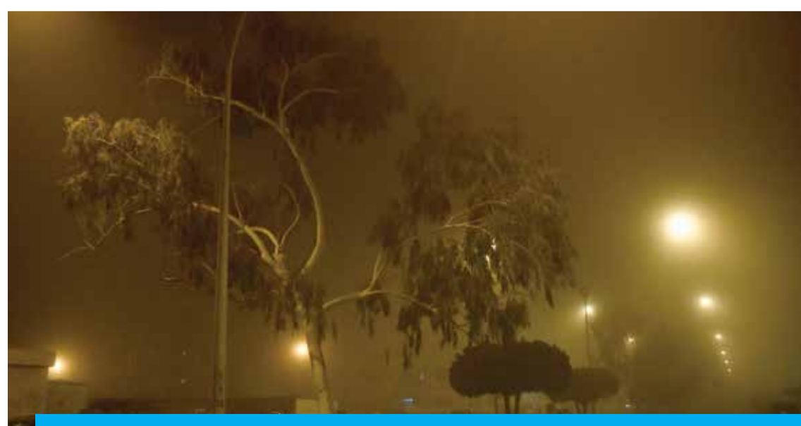
Kuwait under unsteady northern and northwesterly winds triggering dust.

Visibility has reached a record level in the northwestern region, recording 400 meters, and ranged between 1,500 and 2,000m in residential regions and some coastal areas, he added. The persistent northerly and northwesterly winds, along with the hot, dry conditions, and drop in horizontal visibility are expected to continue to prevail, Al-Bloushi forecasted, warning sea-