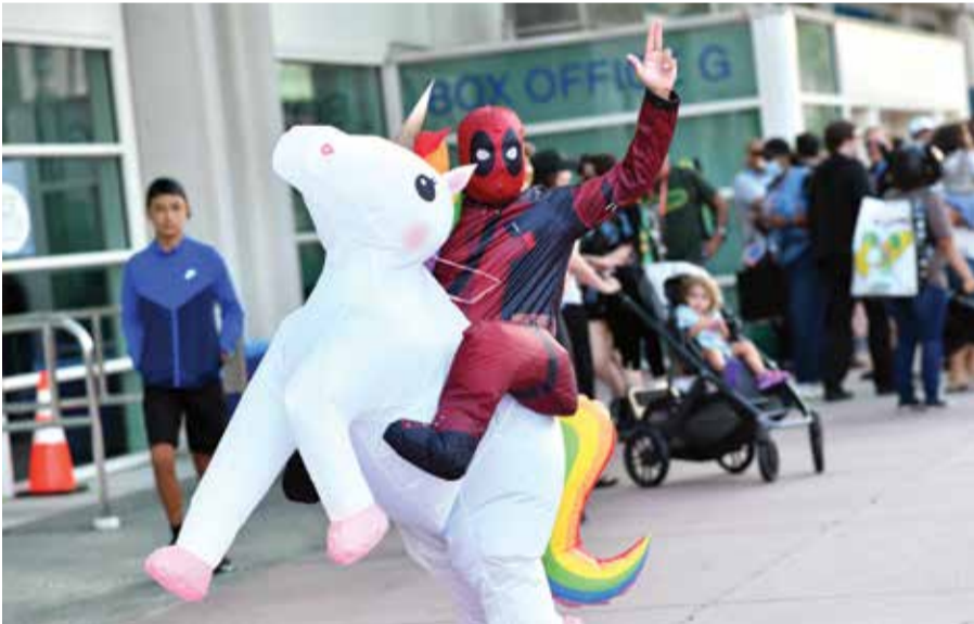
A Deadpool on a Unicorn cosplayer walks outside the convention center.

Ryan Reynolds and Hugh Jackman kicked off celebrations at the giant Comic-Con pop culture gathering Thursday with a special screening of "Deadpool & Wolverine," their smutty superhero mash-up movie expected to break box office records this weekend. The Hollywood A-listers took the stage before 6,000 screaming fans - many dressed as spandex-clad heroes and villains - who had won a lottery to attend the hot-ticket opening night event in San Diego, California.