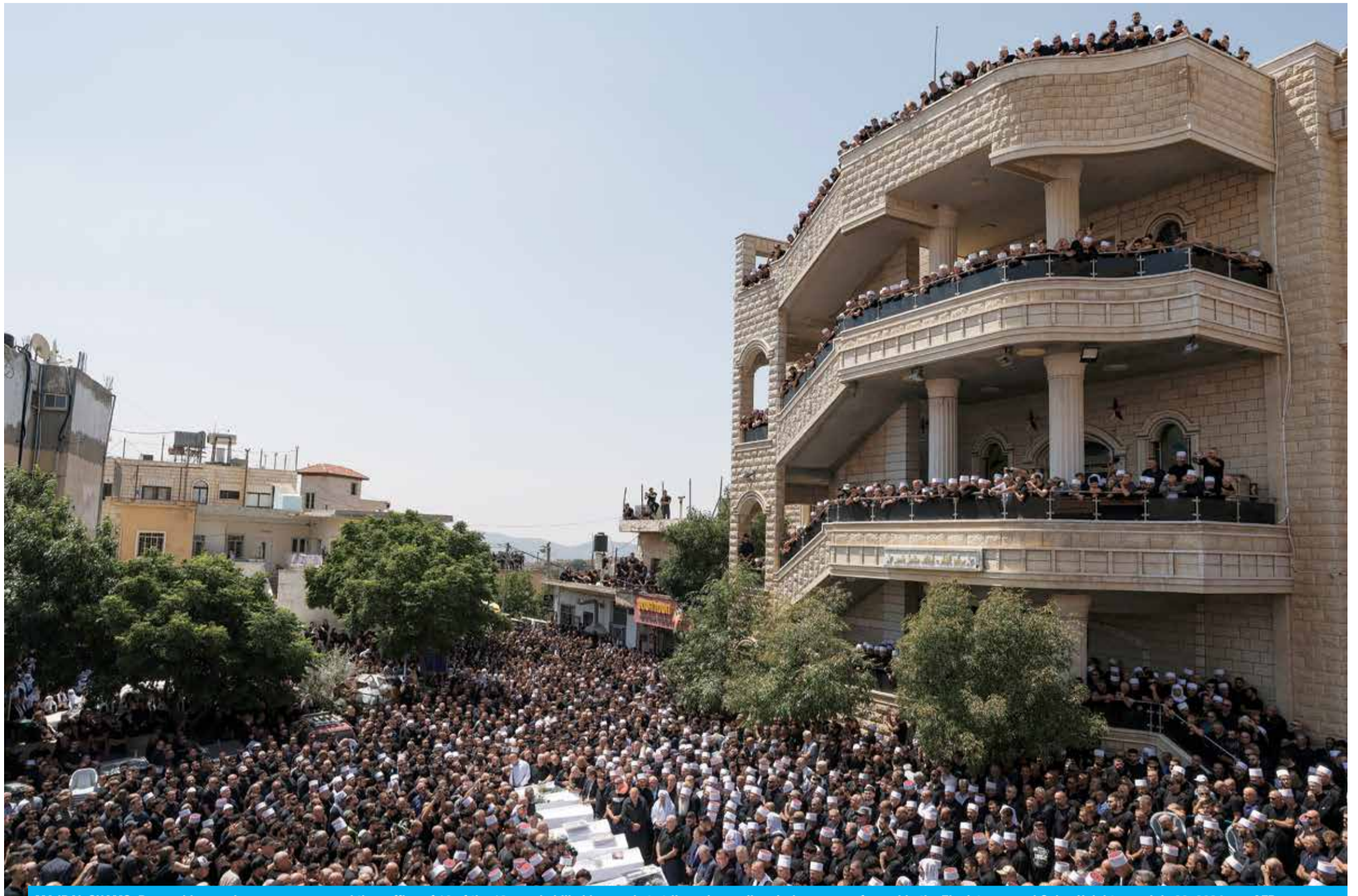
MAJDAL SHAMS: Druze elders and mourners surround the coffins of 10 of the 12 people killed in a rocket strike a day earlier, during a mass funeral in the Zionist-annexed Golan Heights, on July 28, 2024.