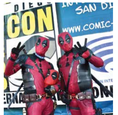
Deadpool cosplayers pose outside the convention center.