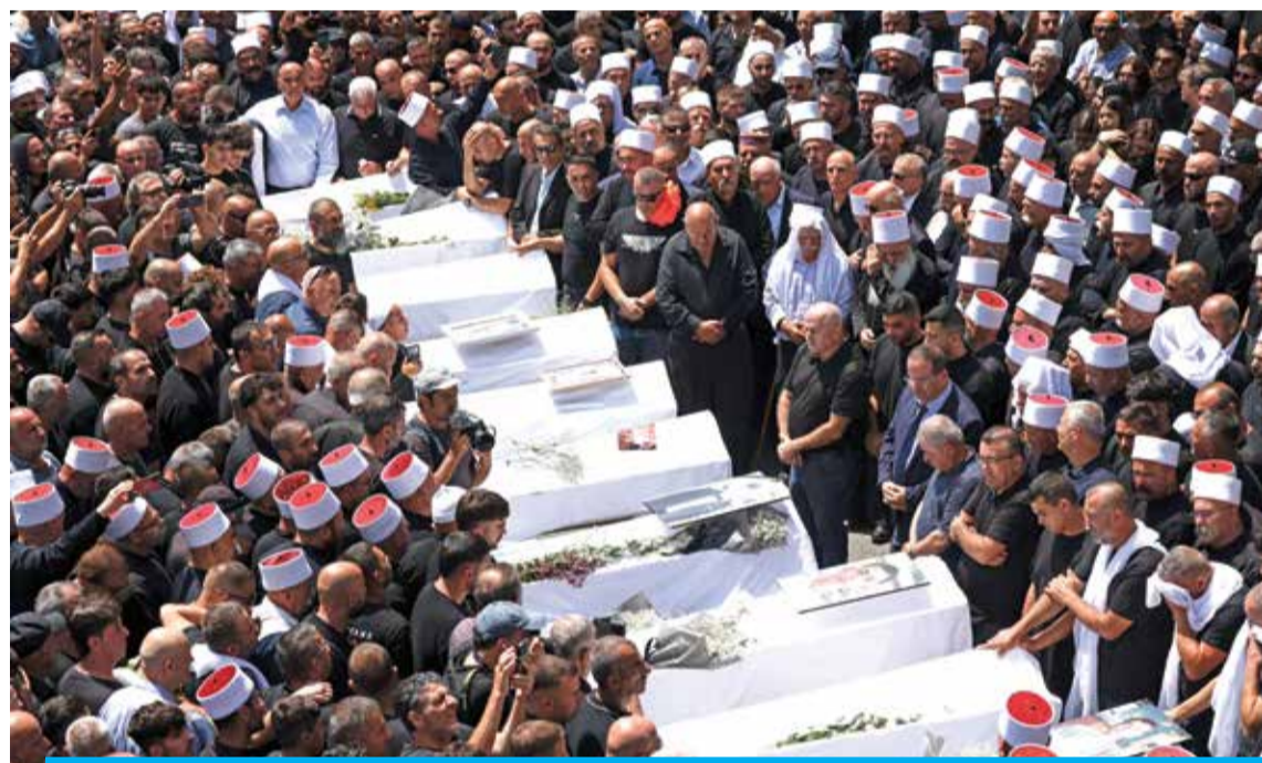
MAJDAL SHAMS: Druze elders and mourners surround the coffins of 10 of the 12 people killed in a rocket strike from Lebanon a day earlier, during a mass funeral in this Druze town in the Zionist-annexed Golan Heights on July 28, 2024. — AFP (See Page 5)

The news channel, explained Dr Enezi, is an official source for local news including state decisions and its positions, and also serves as a connection point between nationals and officials. Enezi commented that this is responsible media that does not seek controversy but aims for objectivity and credibility. The channel is currently transmitting three main news programs on political, economic, cultural and sports topics, as well as some 15 programs, documentaries and talk shows. — KUNA