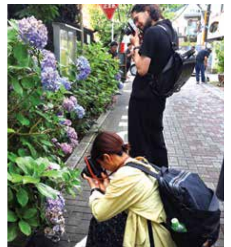
Participants of a film photography tour taking photos in Kamakura, Kanagawa prefecture.