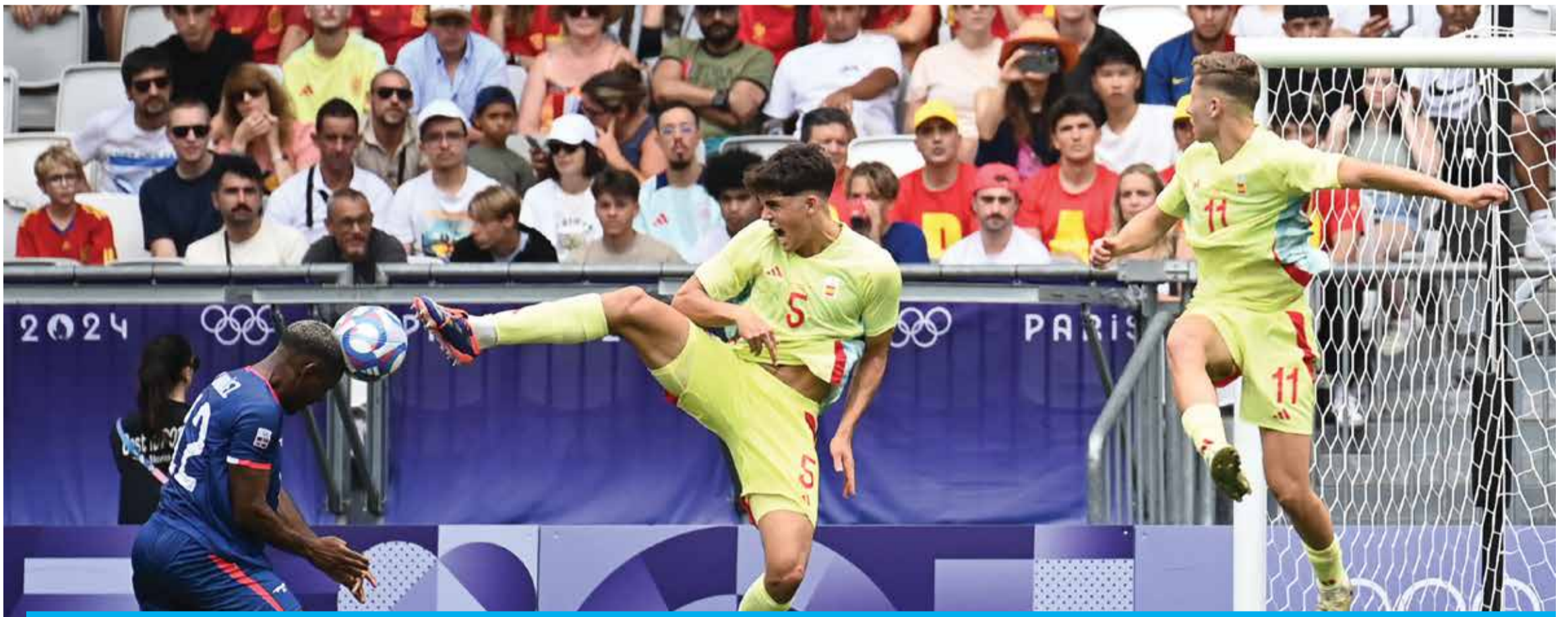
BORDEAUX: Dominican Republic's defender #12 Joao Urbaez fights for the ball with Spain's defender #05 Pau Cubarsi in the men's group C football match between the Dominican Republic and Spain during the Paris 2024 Olympic Games at the Bordeaux Stadium in Bordeaux.

Argentina face Ukraine while Morocco meet Iraq