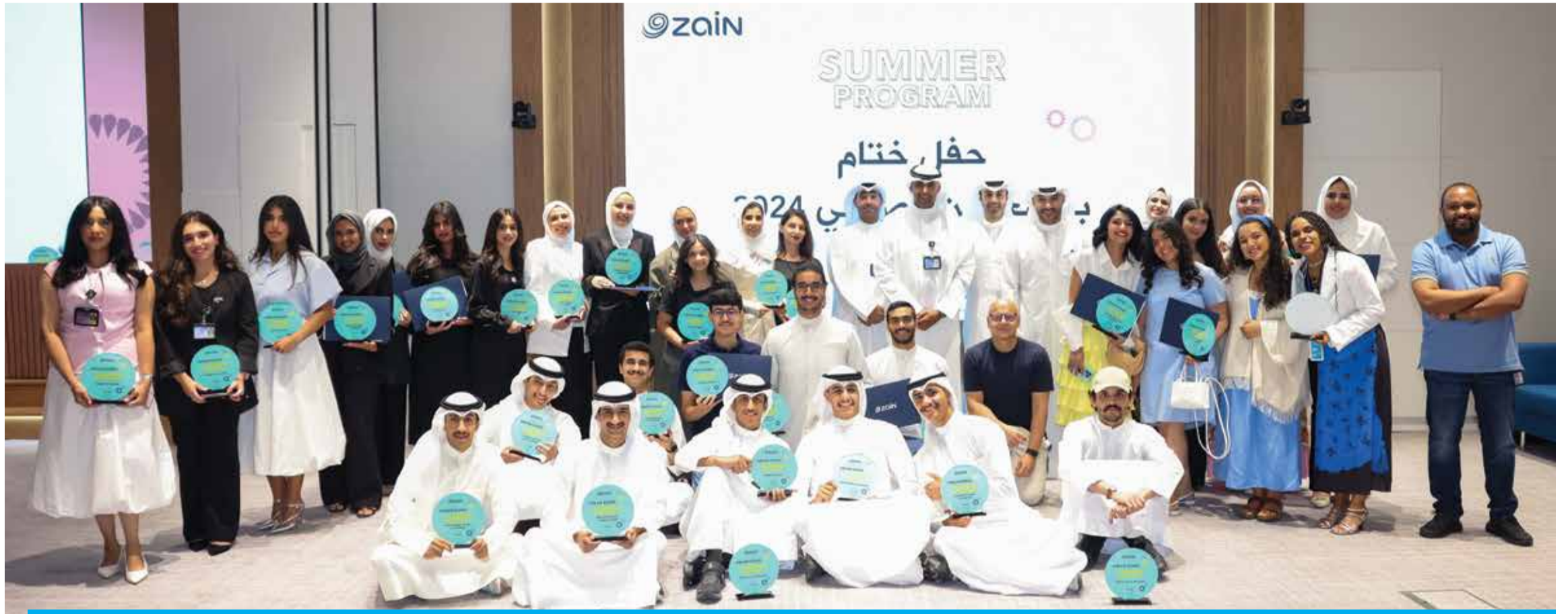
Officials from Zain and partners with the graduates.

Company concludes 5th edition, recognizes students and success partners