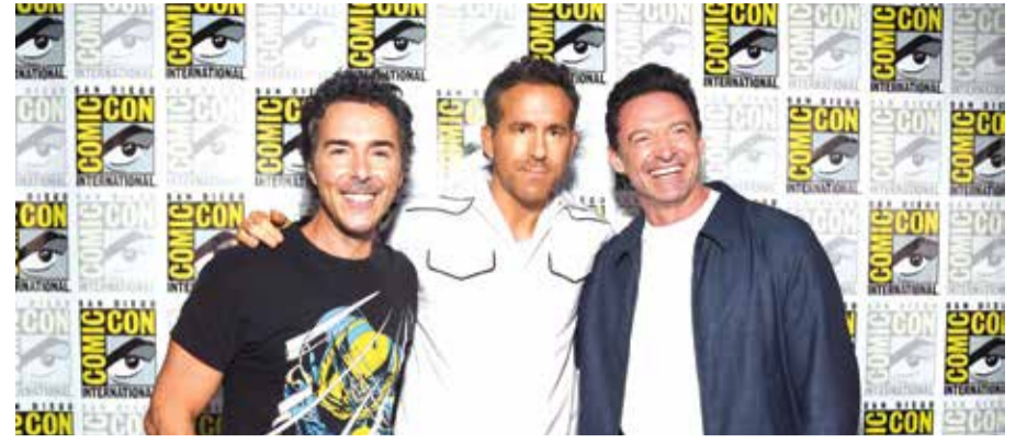
(From left) Shawn Levy, Ryan Reynolds and Hugh Jackman attend Marvel Studios: The Ultimate Deadpool & Wolverine Celebration of Life in Hall H at SDCC in San Diego, California.