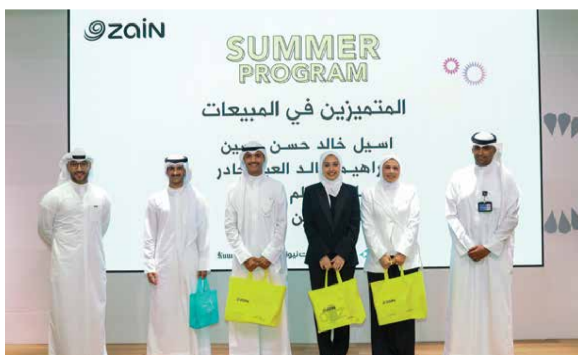
Recognizing top-performing students.

The workshop also covered verbal and written communication, business and creative writing, CV drafting, and job search strategies. Students learned about problem-solving, decision-making,