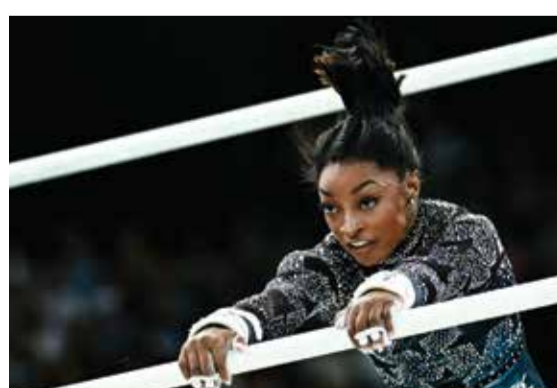
PARIS: US' Simone Biles competes in the uneven bars event of the artistic gymnastics women's qualification during the Paris 2024 Olympic Games at the Bercy Arena in Paris, on July 28, 2024.

Biles is competing in Paris three years after her campaign at the Tokyo Olympics unravelled due to a disorientating condition gymnasts call "twisties". She still went home with a silver and bronze and was