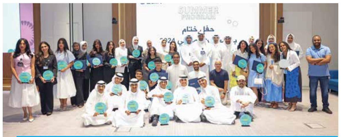
KUWAIT: Officials from Zain and partners with the graduates.

The ceremony honored all the program participants who demonstrated enthusiasm, passion, and commitment to developing their skills throughout the month-long program. The company also recognized distinguished students who achieved the highest sales among their peers while working at Zain's branches, as well as those who created the most unique media