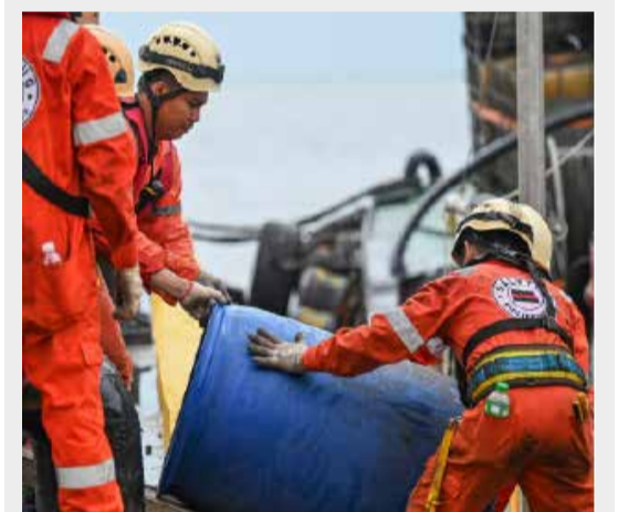
LIMAY: Crew of a private company loads a barrel of oil spill dispersant to be used in the oil spill response, at a port in Limay, Bataan on July 26, 2024. — AFP

Another tanker sank off the central island of Guimaras in 2006, spilling tens of thousands of gallons of oil that destroyed a marine reserve, ruined local fishing grounds and covered stretches of coastline in black sludge. The coast guard and a private salvage operator are also working to offload an unspecified amount of diesel from another tanker that sank at the mouth of Manila Bay, a coast guard statement said. — AFP