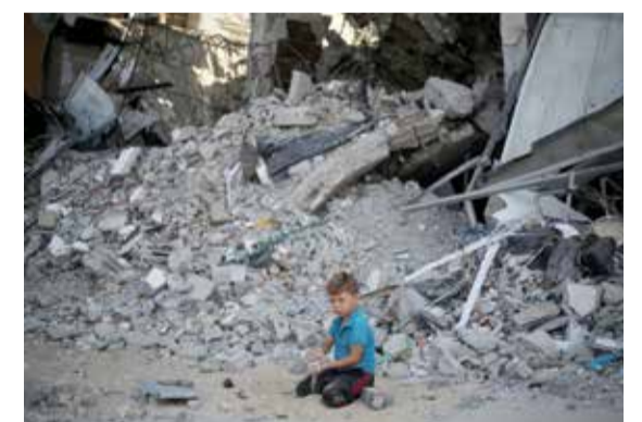
GAZA: A Palestinian boy sits playing on the sand and rubble of a building destroyed by Zionists in the al-Bureij refugee camp in the central Gaza Strip on July 28, 2024.

Meanwhile, the head of Iraq's delegation said Olympic chiefs had rejected their request not to display Zionist flag next to Iraq's during the Paris Games. Iraq's men's football team beat Ukraine 2-1 on Wednesday in Lyon and lost 3-1 to Argentina on Saturday. "When we arrived