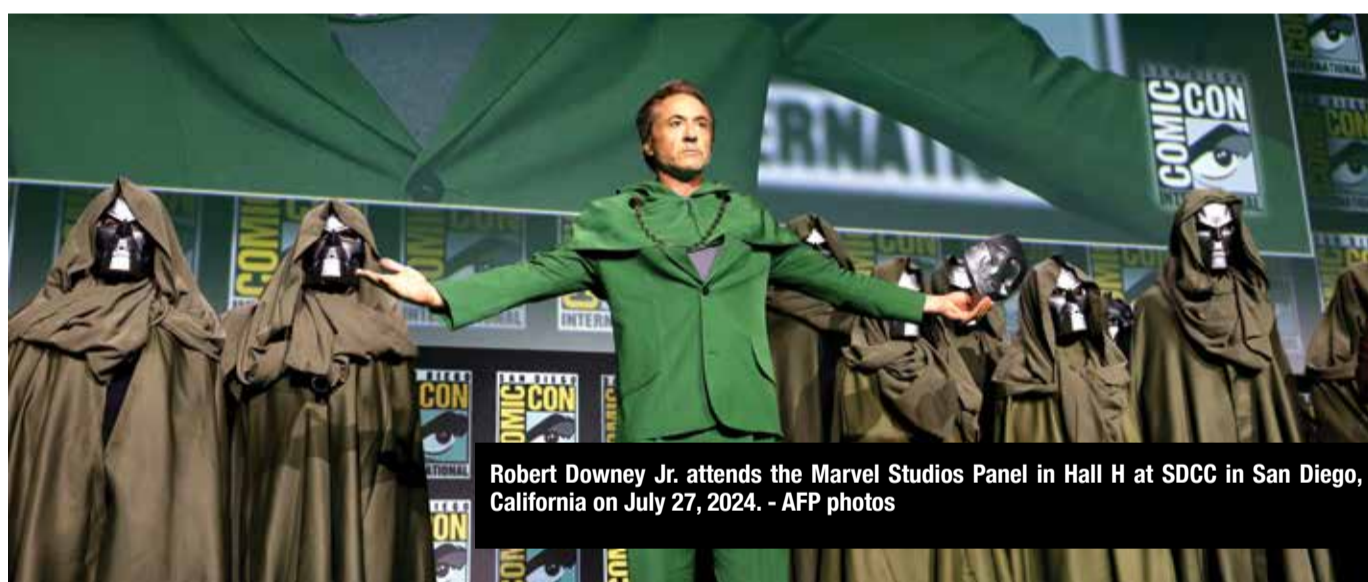
Robert Downey Jr. attends the Marvel Studios Panel in Hall H at SDCC in San Diego, California on July 27, 2024.

He appeared anonymously on stage among a group of hooded and masked figures, before stepping forward and revealing his much-rumored return. "New mask. Same task. What'd I tell you? I like playing complicated