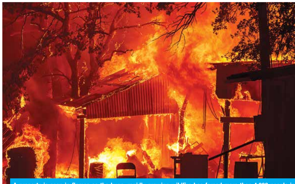
A property is seen in flames as the huge, rapidly growing wildfire has forced more than 4,000 people in northern California to evacuate.

CHICO: A fire raging out of control in northern California has rapidly become among the biggest ever in the western US state, authorities said Saturday. The so-called Park Fire burned more than 350,000 acres (142,000 hectares) as of Saturday evening, making it the seventh-largest ever recorded in California history, the state agency Cal Fire said.