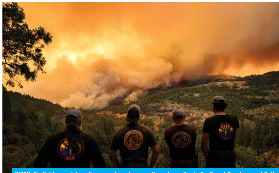
CHICO: Firefighters watch as flames and smoke move through a valley in the Forest Ranch area of Butte County as the Park Fire continues to burn near Chico, California, on July 26, 2024.

Blaze just 10% controlled despite efforts of more than 3,700 personnel, a dozen helicopters