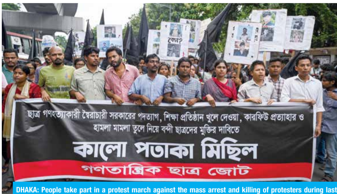
DHAKA: People take part in a protest march against the mass arrest and killing of protesters during last week's violence amid anti-quota protests, in Dhaka on July 28, 2024.

"Today, we work in broad daylight, in a free and dignified manner," he added, proudly showing his leafy crops in the commune of Mansoura, in the Chefchaouen region southeast of Tangiers. Chefchaouen is one of the three provinces where cannabis cultivation is permitted under the 2021 law for non-recreational use.