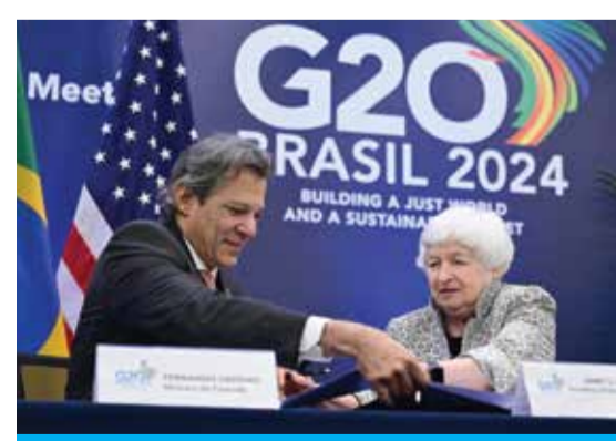
RIO DE JANEIRO: Brazil's Economy Minister Fernando Haddad (left) and US Treasury Secretary Janet Yellen sign an agreement during the G20 economic ministers' meeting in Rio de Janeiro, Brazil, on July 26, 2024.

She said the banks should also catalyze new business models to mobilize investments that support nature and biodiversity while strengthening economies