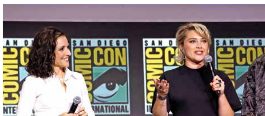
Julia Louis-Dreyfus (left) and Florence Pugh speak onstage.