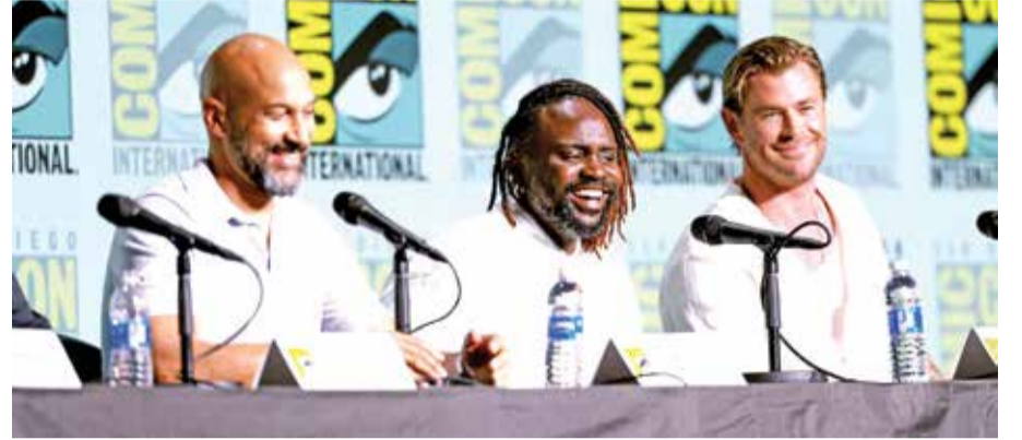
(From left) Keegan-Michael Key, Brian Tyree Henry and Chris Hemsworth speak during the "Paramount Animation and Hasbro Entertainment: 'Transformers One'" panel during 2024 Comic-Con International at San Diego Convention Center.