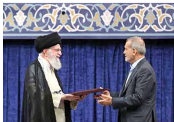
TEHRAN: Iranian supreme leader Ayatollah Ali Khamenei delivers an official endorsement letter to President-elect Masoud Pezeshkian on July 28, 2024.

Following the event, acting president Mohammad Mokhber handed over official responsibilities to 69-year-old Pezeshkian. Later Sunday, Pezeshkian appointed reformist Mohammad Reza Aref, 72, as his first vice president, according to an announcement carried by state TV. Aref has represented Tehran in parliament and served as first vice president and communications minister under Iran's last reformist president Mohammad Khatami, who held office from 1997 to 2005.