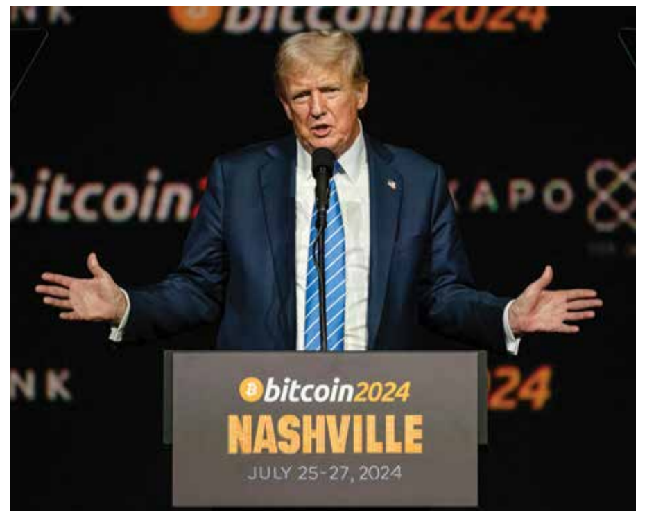
NASHVILLE: Former US president and 2024 Republican presidential candidate Donald Trump gestures while giving a keynote speech on the third day of the Bitcoin 2024 conference at Music City Center on July 27, 2024.

Trump tried in vain to ban Chinese-owned video app TikTok on national security grounds during his presidency, and spoke out against China routinely during his failed bid for reelection in 2020. Trump expressed concerns—echoed by political rivals—that the Chinese government might tap into US TikTok users' data or manipulate what they see on the platform. He even called for a US company to buy TikTok, with the government sharing in the sale price.