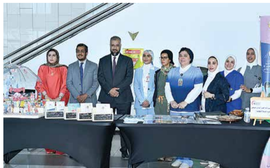
KUWAIT: Ministry of Health marks World Hepatitis Prevention Day on July 28 at the Yarmouk Health Center with the participation of 40 preventive health centers.