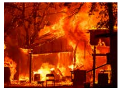
California fire rapidly becomes among largest in state's history