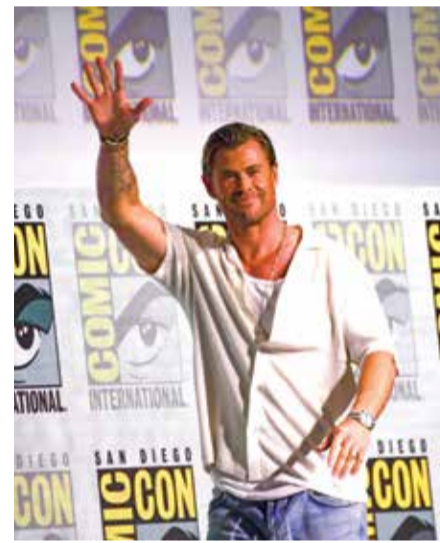
Australian actor Chris Hemsworth arrives to attend Paramount's animation panel for "Transformers One" during Comic Con International.

Out in theaters globally this weekend, "Deadpool & Wolverine" is expected to shatter the box office record for