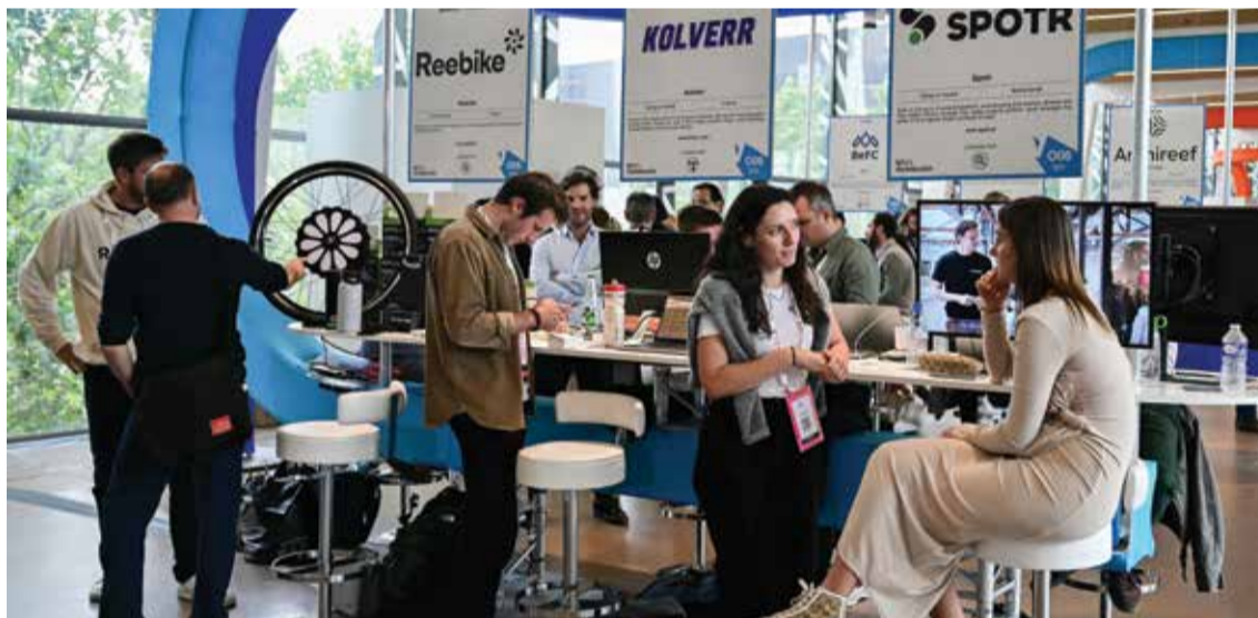
PARIS: People react on the EDF Impact Bridge stand which welcomes its collaborating start-ups in the social and environmental fields, during the 8th edition of the Vivattech technology startups and innovation fair, at the Porte de Versailles exhibition centre in Paris in this May 23, 2024 file photo.

Breaking from typical Silicon Valley legend, generative AI won't be developed out of some founder's garage. That type of artificial intelligence, which creates human-like content in just seconds, is a special