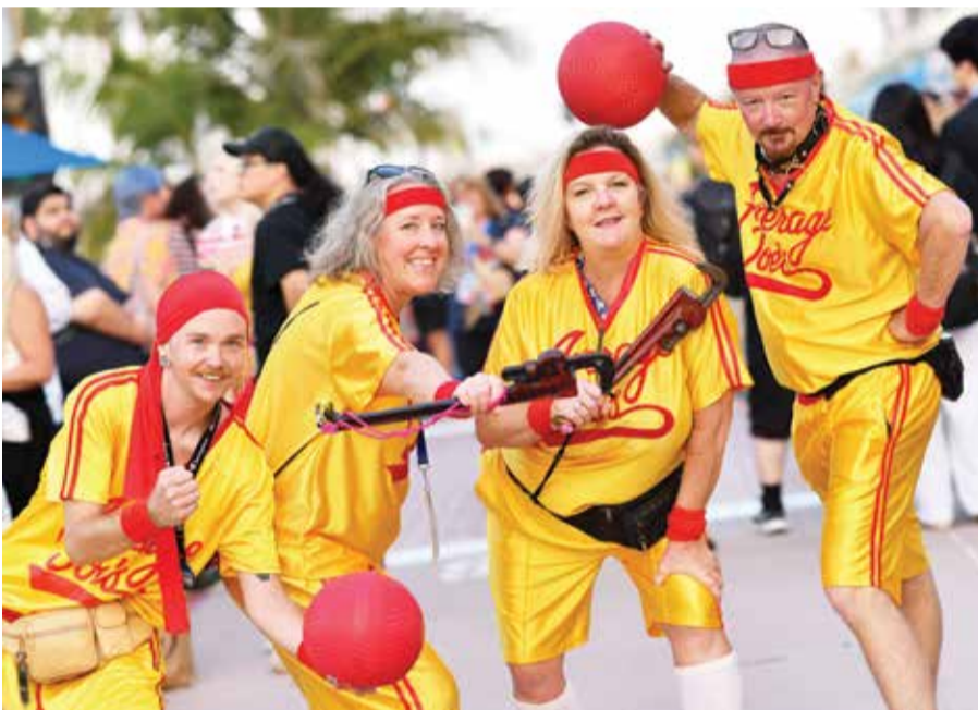
Cosplayers walk outside the convention center during Comic Con International in San Diego, California.