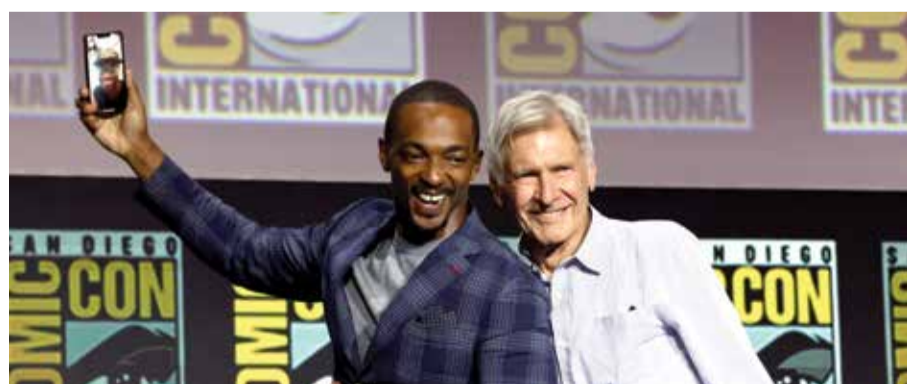
Anthony Mackie (left) and Harrison Ford speak onstage during the Marvel Studios Panel in