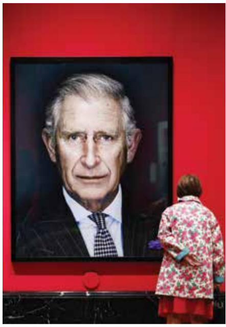
A visitor reads the museum label of the photograph "King Charles III when the Prince of Wales" by British Photographer Nadav Kander.