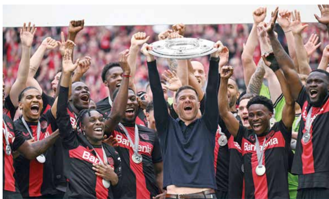
LEVERKUSEN: (FILES) Bayer Leverkusen's Spanish head coach Xabi Alonso and his players celebrate with the Bundesliga trophy after the German first division Bundesliga football match between Bayer 04 Leverkusen and FC Augsburg in Leverkusen.