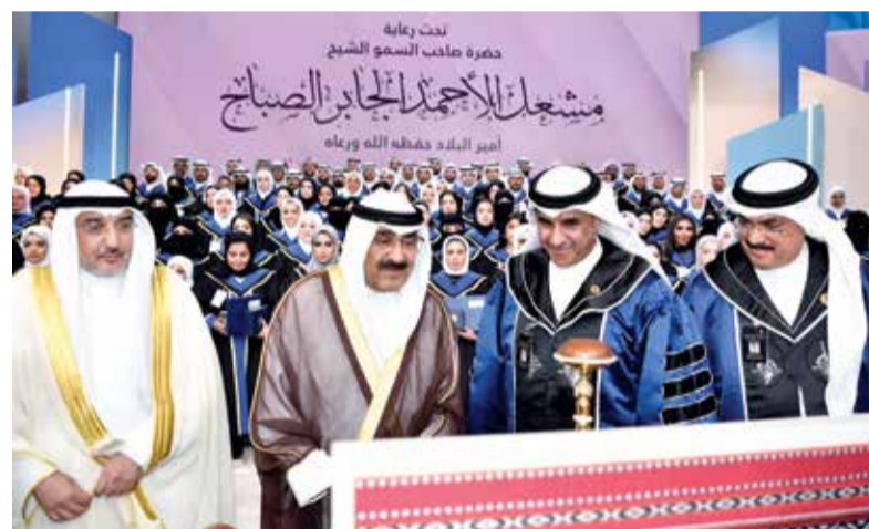
His Highness the Amir Sheikh Mishal Al-Ahmad Al-Jaber Al-Sabah receives a commemorative gift.