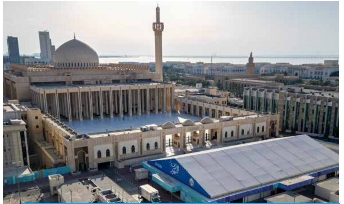
Zain's Iftar Hall at the Grand Mosque served fasting individuals daily during Ramadan.

It was supervised by a certified judges panel from the Ministry of Awqaf and Islamic Affairs in collaboration with the Grand Mosque. In a step to engage its employees in its community programs and initiatives, Zain also held the fourth Holy Quran Recitation Competition for employees and their children. The competition was held at the Grand Mosque, and the first three winners in each of the six categories were awarded with cash prizes.