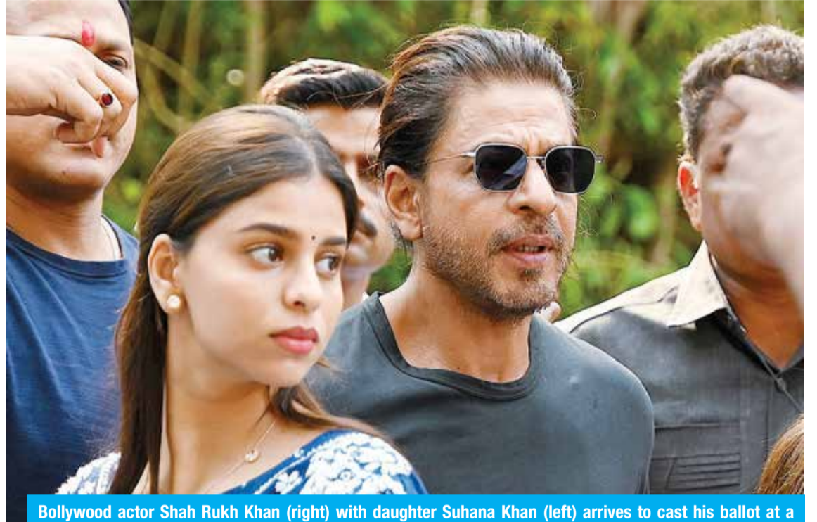
Bollywood actor Shah Rukh Khan (right) with daughter Suhana Khan (left) arrives to cast his ballot at a polling station in Mumbai on May 20, 2024.

MUMBAI: A parade of India's business and entertainment elite — many of them supporters of Prime Minister Narendra Modi — went to the polls Monday as the financial capital Mumbai voted in the latest round of the country's six-week election.