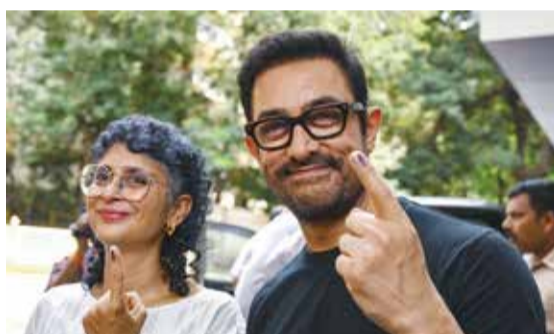
Bollywood actor Aamir Khan and director Kiran Rao (left) display ink marked fingers after casting their votes at a polling station.