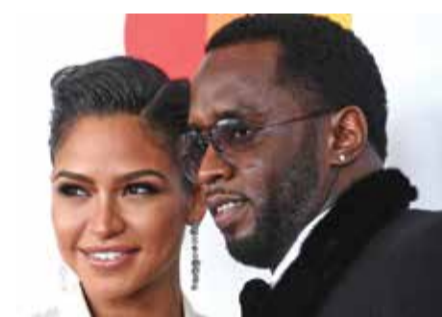
Singer and model Cassie Ventura (left) and Rap mogul P Diddy (aka Sean Combs) arrive for the traditional Clive Davis party on the eve of the 60th Annual Grammy Awards on January 28, 2018, in New York.

It took Rubik several prototypes and weeks of tinkering to figure out the ideal mechanism -- and a way to solve his puzzle -- before he could file a patent application in 1975. The colourful "Mag-