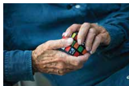
Hungarian inventor Erno Rubik holds a Rubik's Cube 3D puzzle in his hands.