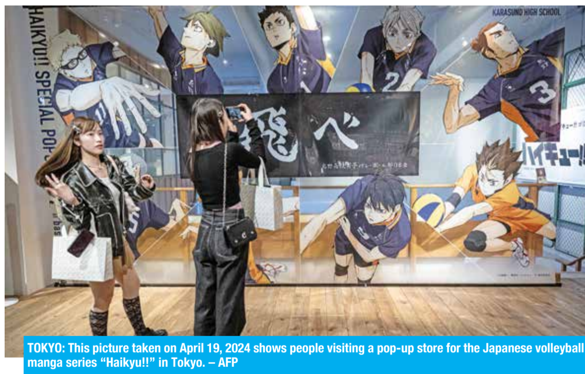
TOKYO: This picture taken on April 19, 2024 shows people visiting a pop-up store for the Japanese volleyball manga series "Haikyu!!" in Tokyo.