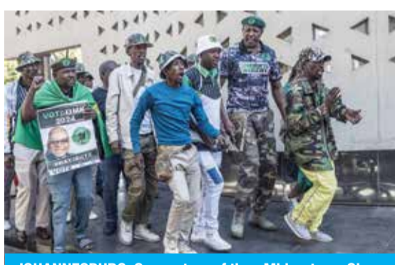
JOHANNESBURG: Supporters of the uMkhonto weSizwe (MK) political party march and chant slogans outside South African Constitutional Court following the ruling that declares former president and uMkhonto weSizwe (MK) leader Jacob Zuma ineligible as a candidate in the upcoming South African general election.

The electoral commission said ballot papers would not be reprinted nine days from the vote and Zuma's photo would still appear next to his party's name. "Jacob Zuma is still the party leader, Jacob