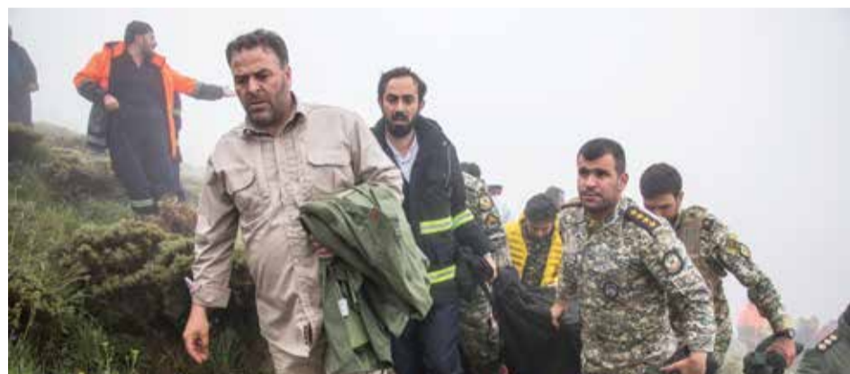
VARZAGHAN: Rescue team members recover the body of a victim from the crash site of a helicopter carrying Iranian President Ebrahim Raisi in northwestern Iran, on May 20, 2024.

Interested applicants should visit www.imf.org/jobs for the full vacancy information and to apply to requisition # 24-R6743.