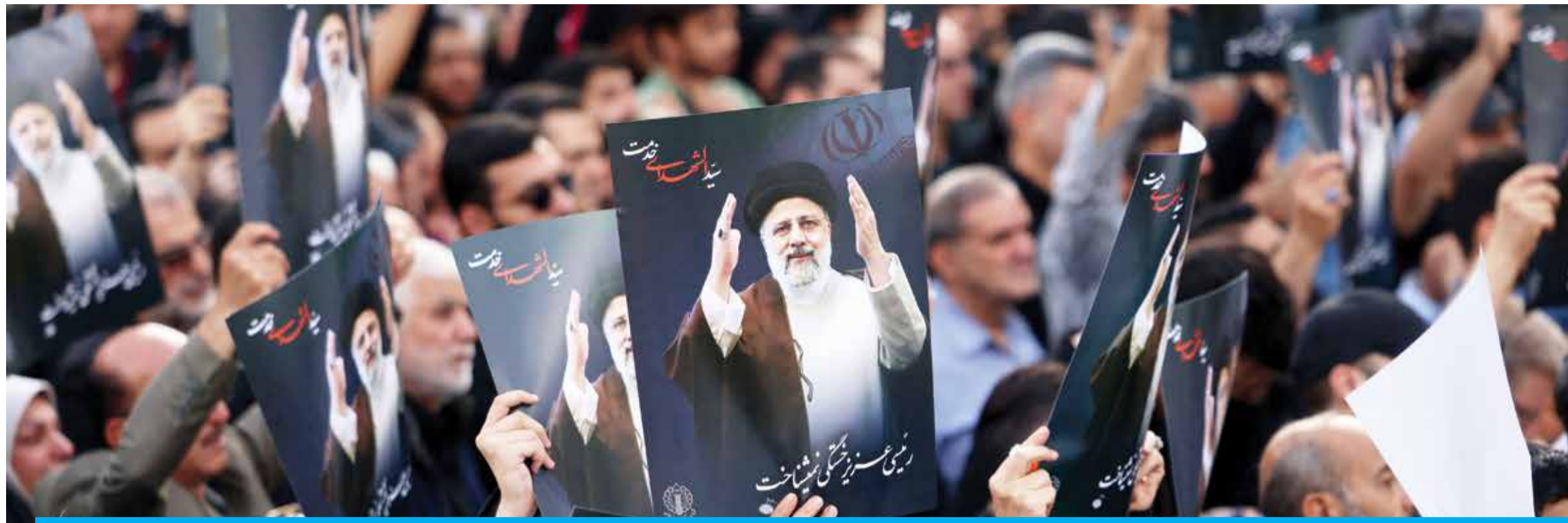
TEHRAN: Iranians gather at Valiasr Square in central Tehran to mourn the death of President Ebrahim Raisi, Foreign Minister Hossein Amir-Abdollahian and seven others in a helicopter crash the previous day, on May 20, 2024.