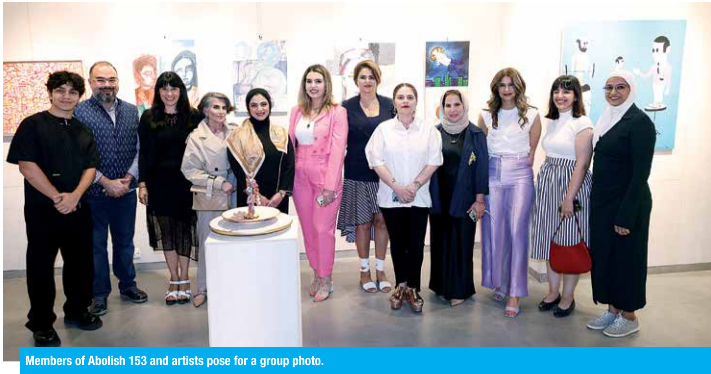
Members of Abolish 153 and artists pose for a group photo.

Event at Boushahri Gallery part of efforts to raise awareness against domestic violence