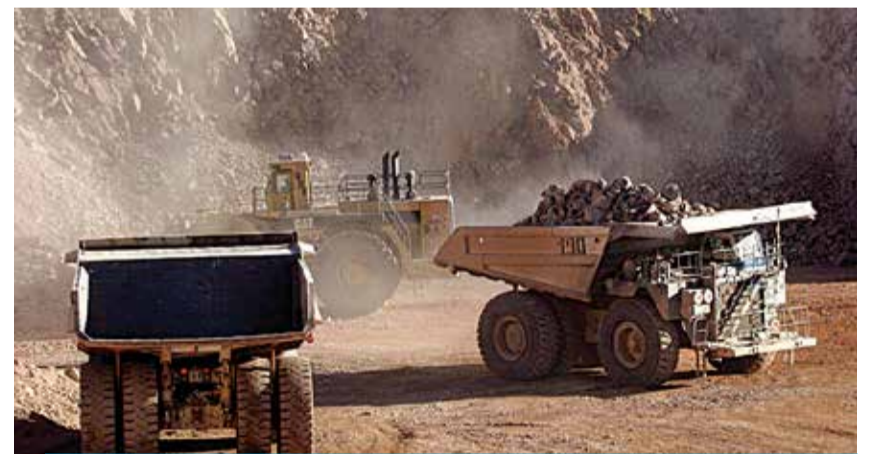
BHP's bid for Anglo American comes as it looks to secure a reliable copper supply. — AFP

"It's exciting to know that the coffee I produce, which is coffee produced by black people, is also roasted by black people," she said. "I'm very happy to know that we are making this connection, from production here on the farm to the cup." — AFP