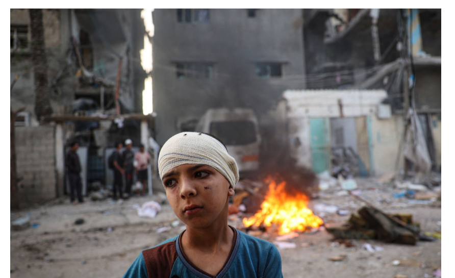
GAZA: An injured Palestinian boy stands next to the rubble of a family house that was hit overnight in Zionist bombardment in the Tal al-Sultan neighbourhood of Rafah in southern Gaza on May 20, 2024.