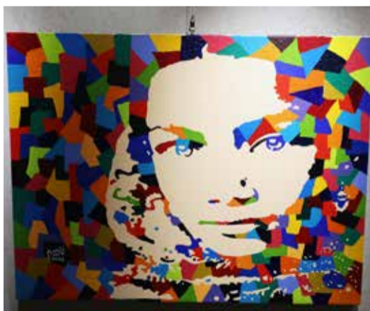
Artworks displayed at the exhibition.