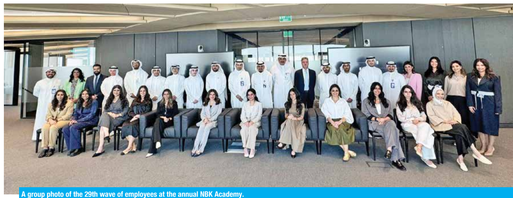
A group photo of the 29th wave of employees at the annual NBK Academy.

The economic impact of the conflict on the rest of the region has remained relatively contained, but uncertainty has increased. For example, the shipping industry has coped with shocks to maritime transport by rerouting vessels away from the Red Sea, but any prolonged disruptions to routes through the Suez Canal could increase commodity prices regionally and globally. The report also looks at rising indebtedness in the MENA region. Between 2013 and 2019, the median debt-to-GDP ratio for MENA economies increased by more than 23 percentage points. The pandemic made things worse as declines in revenue, together with pandemic support spending, increased financing needs for many countries. This rising indebtedness is heavily concentrated in oil-importing economies, which now have a debt-to-GDP ratio 50 percent higher than the global average of emerging market and developing economies.—AFP