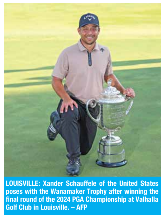
LOUISVILLE: Xander Schauffele of the United States poses with the Wanamaker Trophy after winning the final round of the 2024 PGA Championship at Valhalla Golf Club in Louisville.

Kohli and Bengaluru reached the playoffs after beating Chennai Super Kings in a dramatic final league match at the weekend to keep their hopes alive of a first IPL title.—AFP