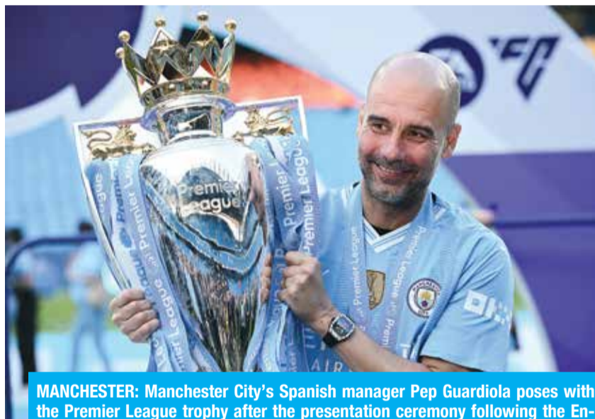
MANCHESTER: Manchester City's Spanish manager Pep Guardiola poses with the Premier League trophy after the presentation ceremony following the English Premier League football match between Manchester City and West Ham United at the Etihad Stadium in Manchester.

"When we won in Istanbul (in the Champions League final) I said, 'It's over, what am I doing here? It's over, there's nothing left.' "But I have a contract, I'm here and still enjoying. Some of the moments I'm a bit tired but