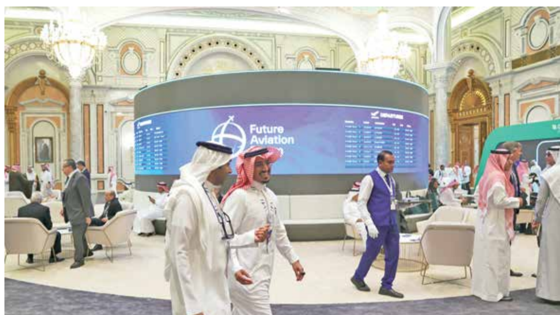
RIYADH: Saudis and foreign delegates attend the Future Aviation Forum in Riyadh on May 20, 2024.

Newcomer Riyadh Air had also announced an agreement to buy 39 Boeing Dreamliners, with options for 33 more jets. Despite ongoing problems at Boeing, which has reported a string of financial losses and has significantly slowed its delivery of new jets while it addresses quality control issues, Riyadh Air is still expected to start flying in the summer of 2025, chief