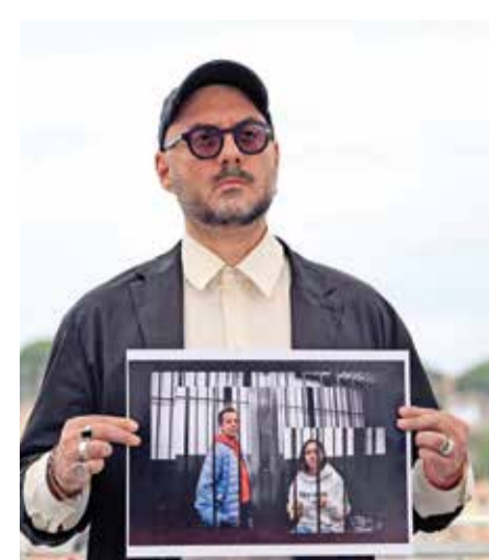
Russian director Kirill Serebrennikov poses with a picture of two theatre artists who went on trial in Moscow during a photocall for the film "Limonov: The Ballad".

"This is the real consequence of the law on foreign agentism," he added, referring to recent laws aimed at identifying Russian civil society groups that are financed from abroad.