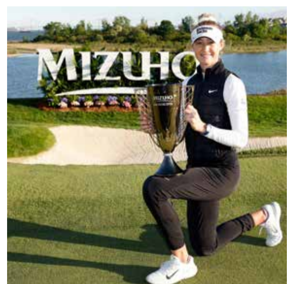
NEW JERSEY: Nelly Korda of the United States poses with the winner's trophy after winning the Mizuho Americas Open at Liberty National Golf Club in Jersey City, New Jersey.