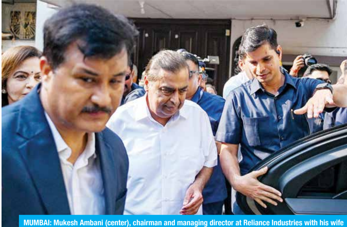
MUMBAI: Mukesh Ambani (center), chairman and managing director at Reliance Industries with his wife Nita Ambani (left) leave a polling booth after casting their ballots.

Less red tape, less corporate tax rates help Modi win corporate titans' hearts: Expert