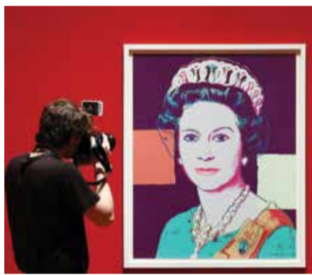
A member of the media photographs the screenprint "Reigning Queens (Royal Edition) Queen Elizabeth II of the United Kingdom" by American artist Andy Warhol.

The exhibition opens with a small but imposing blue room, with just two photos: one marking the engagement