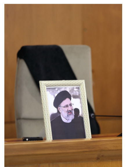
TEHRAN: A handout picture shows the empty seat of late Iranian President Ebrahim Raisi during a cabinet meeting on May 20, 2024. (See Page 5)

Thousands of mourners massed in central Tehran's Valiasr Square to pay their respects to Raisi as well as