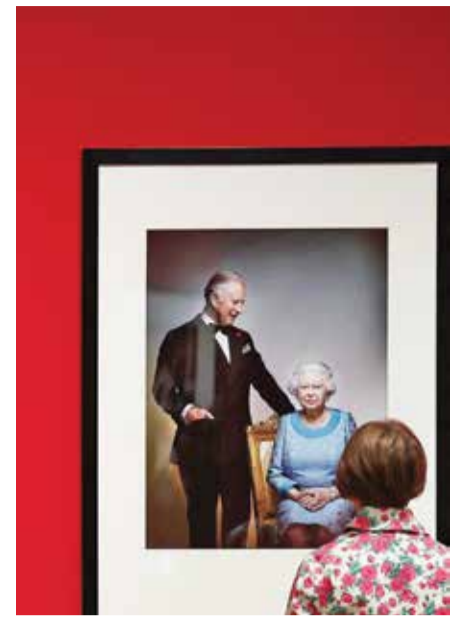
A visitor looks at photographs of Britain's King Charles III and the late Queen Elizabeth II, during a press preview.