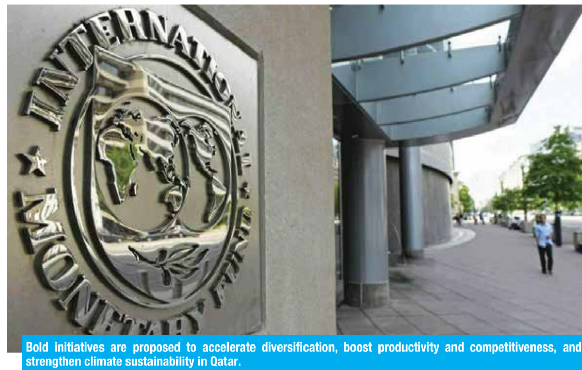
Bold initiatives are proposed to accelerate diversification, boost productivity and competitiveness, and strengthen climate sustainability in Qatar.

en the issuance of real estate and broker licenses and impose stricter penalties on intruders to prevent fraud and deceit. This will also help prevent money-laundering, which previously found an easy market. Additionally, we need a real estate authority that takes care of this large market, involving the Ministry of Commerce, the Municipality, and the Ministry of Justice. There is also a need to issue laws and tighten control over the market and establish modern mechanisms for buying and selling real estate," he pointed out.