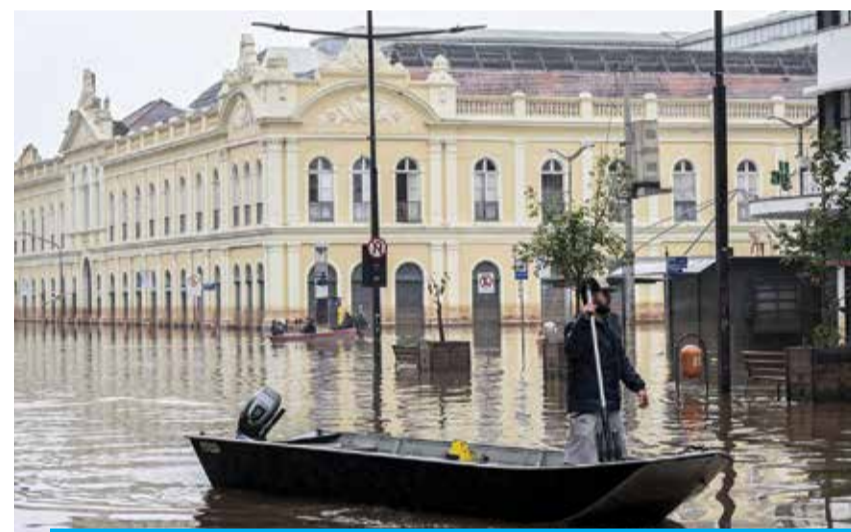
A man navigates a boat through a flooded street in front of the public market in downtown Porto Alegre on May 19, 2024.