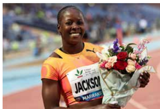
MARRAKESH: Jamaica's Shericka Jackson celebrates winning the women's 200m during the IAAF Diamond League competition at the Grand Stadium in Marrakesh.

Lithuania's Mykolas Alekna, the new world record holder, was the only man to go past the 70-metre mark, by 70 centimetres, to win the men's discus, Australia's Common-