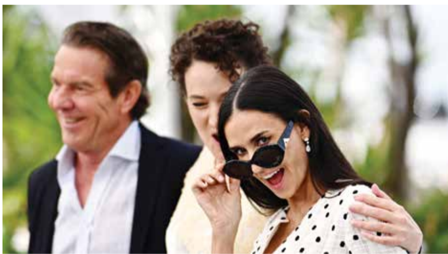
(From left) US actor Dennis Quaid, French director Coralie Fargeat and US actress Demi Moore pose during a photocall for the film "The Substance".