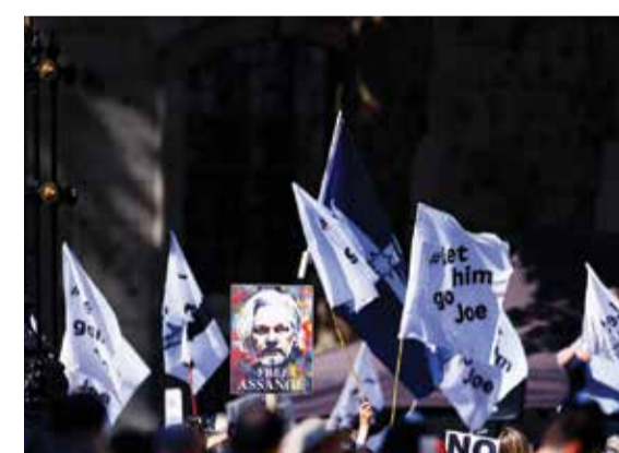
LONDON: Supporters of WikiLeaks founder Julian Assange, fly a banner featuring an image of Assange, as they protest in support of him on May 20, 2024.