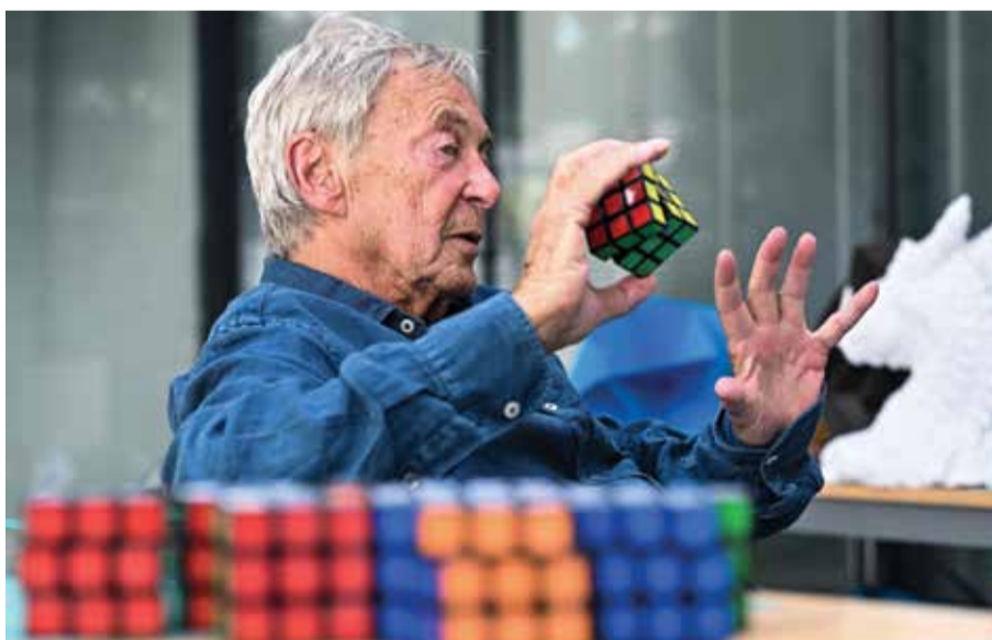
Hungarian inventor Erno Rubik sits next to several Rubik's Cubes.

In a digital world "we are slowly forgetting that we have hands", Rubik said. But playing with the cube helps us tap back into something deeply primal about doing things with our hands, he said -- "our first tools", as he calls them.