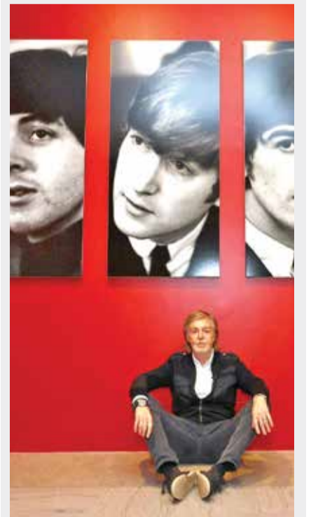
In this image released on May 3, Sir Paul McCartney visits Paul McCartney Photographs 1963-64: Eyes of the Storm at Brooklyn Museum on April 29, 2024 in Brooklyn, New York.

This is partly due to plans by the government to scrap the "non-dom tax status" from next year, the system whereby people do not pay UK tax on their overseas earnings.