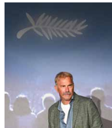
Kevin Costner arrives for a press conference for the film "Horizon: An American Saga".