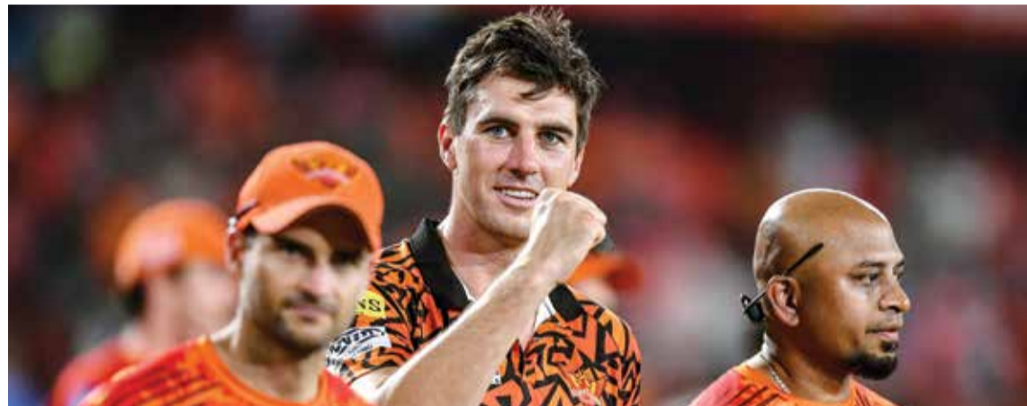
HYDERABAD: Sunrisers Hyderabad's captain Pat Cummins (C) greets supporters after his team's win in the Indian Premier League (IPL) Twenty20 cricket match between Sunrisers Hyderabad and Punjab Kings at the Rajiv Gandhi International Stadium in Hyderabad.

His lower-order batting—Cummins scored an IPL fifty in 14 balls in 2022 for Kolkata—has also come in handy with a highest of 35 not out. Cummins has