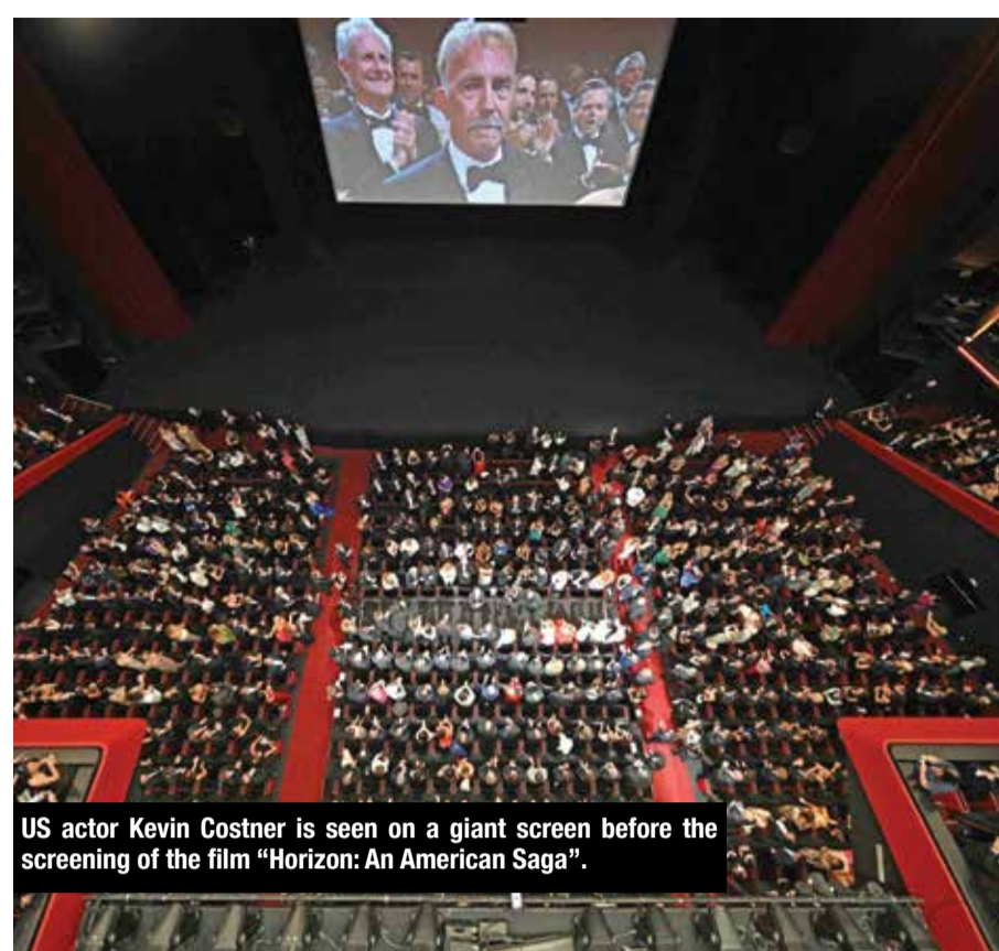
US actor Kevin Costner is seen on a giant screen before the screening of the film "Horizon: An American Saga".