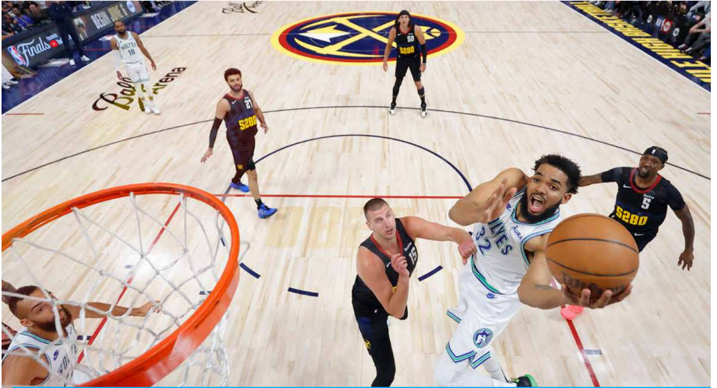
COLORADO: Karl-Anthony Towns #32 of the Minnesota Timberwolves shoots the ball against Nikola Jokic #15 of the Denver Nuggets during the first half in Game Seven of the Western Conference Second Round Playoffs at Ball Arena in Denver, Colorado.

Pacers shoot down Knicks to reach NBA Eastern Conference finals