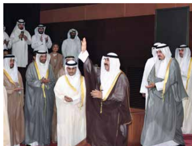
His Highness the Amir Sheikh Mishal Al-Ahmad Al-Jaber Al-Sabah waves at the attendees as he arrives to the ceremony.