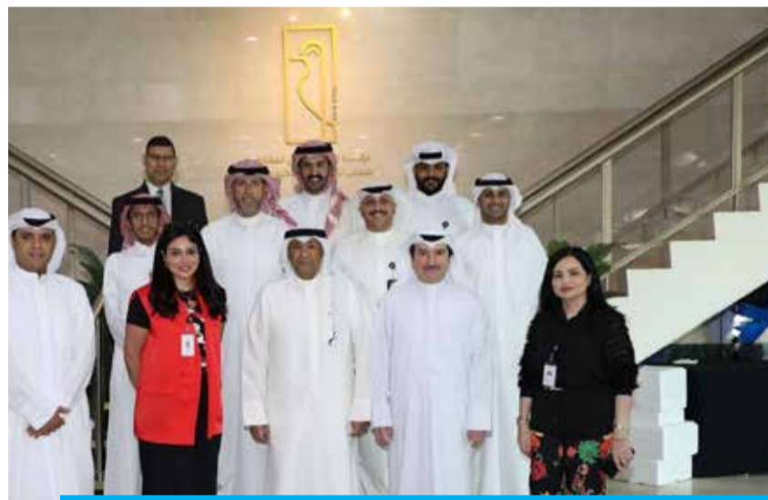
Secretary-General of the Gulf Cooperation Council (GCC) Jasem Al-Budaiwi takes a group photo with other officials during his visit to the GCC Joint Program Production Institution's headquarters in Kuwait.