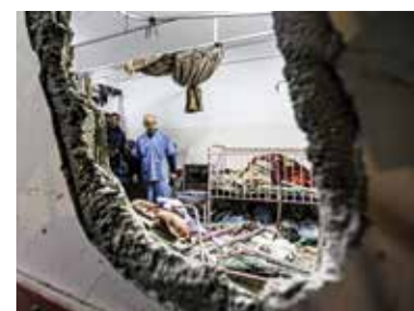
Damaged Gaza hospital reopens