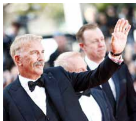
Kevin Costner arrives for the screening of the film "Horizon: An American Saga".

Two Hollywood legends made their comeback at the Cannes Film Festival on Sunday, as Kevin Costner launched his sprawling self-funded Western and Demi Moore returned in a gore-filled body horror flick. The star-studded premieres arrived midway through the world's most famous movie festival, where "Emilia Perez" - a musical about a transgender drug lord, starring Selena Gomez - is currently the talk of the town.