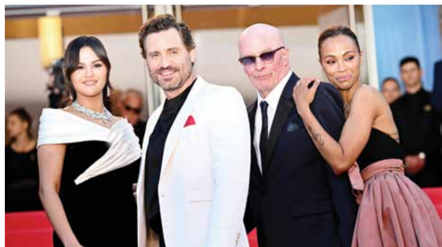
(From left) US actress Selena Gomez, Venezuelan Actor Edgar Ramirez, French director Jacques Audiard and US actress Zoe Saldana arrive for the screening of the film "Emilia Perez".

"I think if you try to make sense of this movie, you'll feel like you're losing your mind," joked Blanchett. The Palme d'Or winner will be unveiled on Saturday, the festival's closing day. — AFP