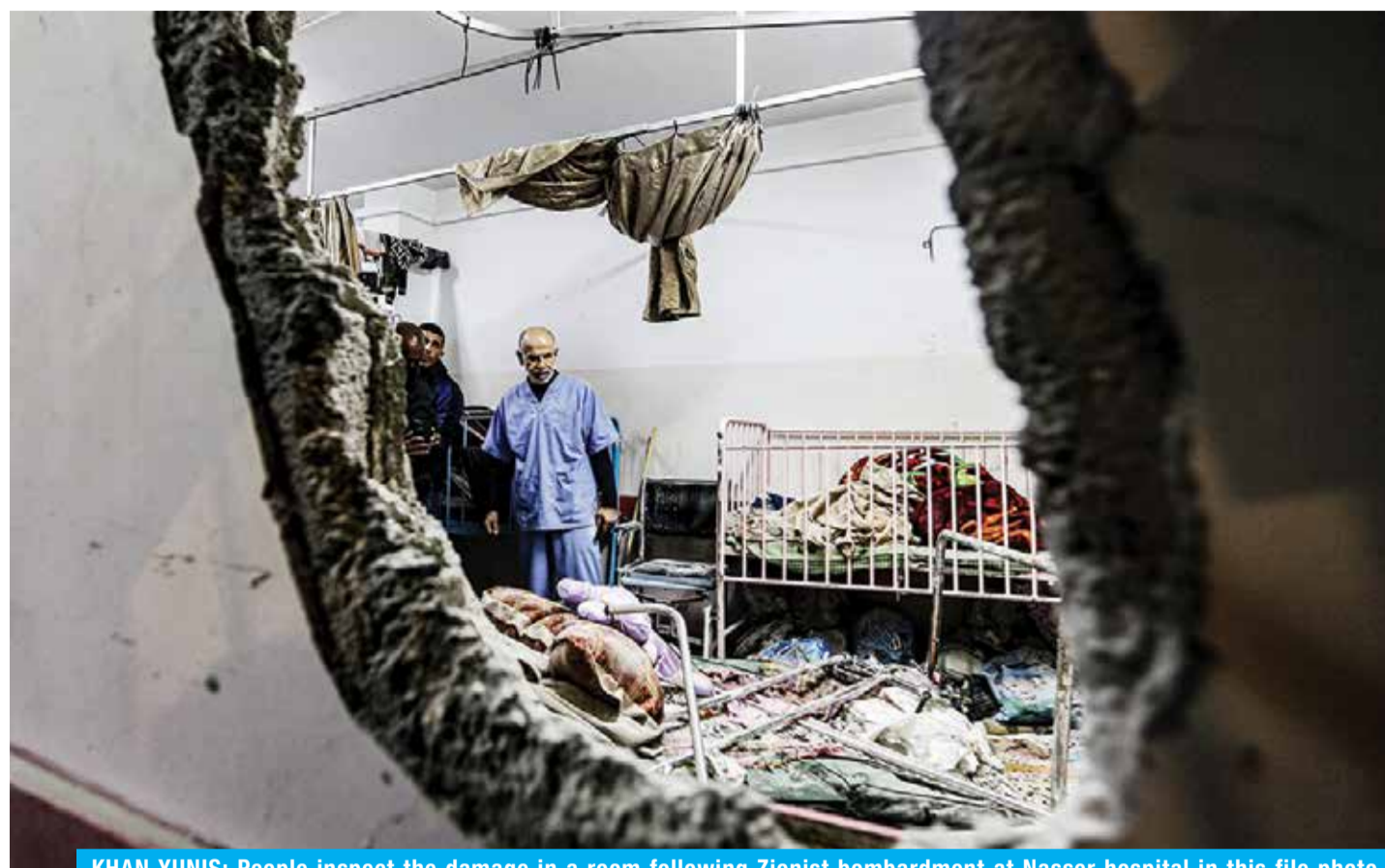
KHAN YUNIS: People inspect the damage in a room following Zionist bombardment at Nasser hospital in this file photo taken in December 2023.

it into Gaza, the UN and NGOs say. The Zionist military cut off electricity to Gaza at the beginning of the war and international organizations fear a total depletion of fuel to run generators.