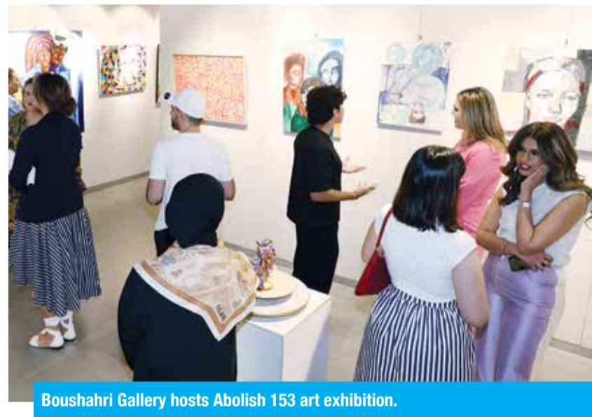
Boushahri Gallery hosts Abolish 153 art exhibition.