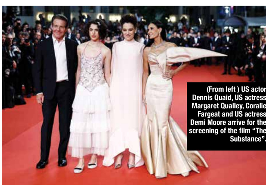
(From left) US actor Dennis Quaid, US actress Margaret Qualley, Coralie Fargeat and US actress Demi Moore arrive for the screening of the film "The Substance".

This year's Cannes is a remarkable return to the red carpet, after years in which Moore has made headlines more for her marriages to Bruce Willis and Ashton Kutcher than her acting. The ultra-graphic film drew gasps and raucous ovations throughout its screening, and also fared much better in reviews.