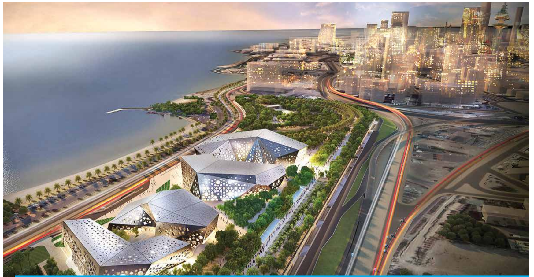
Economic trends in major economies are likely to affect Kuwait's real estate market, particularly in terms of transaction volumes and market values.

"According to economic indicators from America, Europe, and Asia, I can say that from now and for the next year, the Kuwaiti real estate market will experience either stagnation or a decline in the number of transactions and traded value. This is because we have reached a cap due to the gap between asking prices and the purchasing power available to citizens for buying residential properties today."