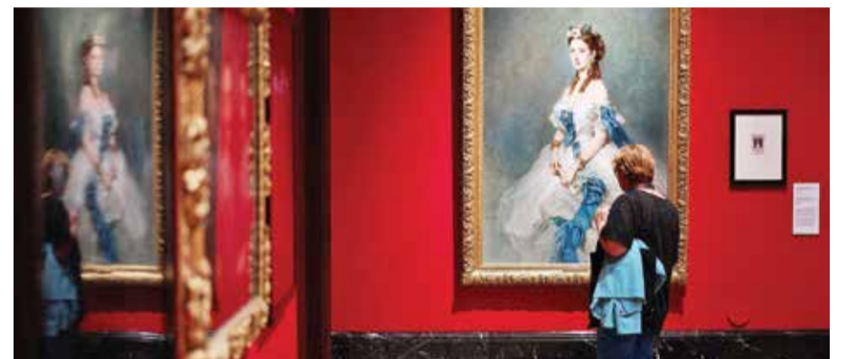
A visitor looks at the painting "Alexandria princess of Wales" by German painter and lithographer Franz Xaver Winterhalter.

In the digital age, where images are shared globally in seconds and accessible by millions, royal photos