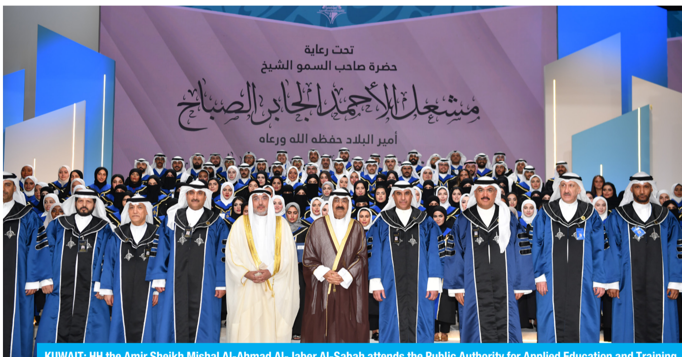
KUWAIT: HH the Amir Sheikh Mishal Al-Ahmad Al-Jaber Al-Sabah attends the Public Authority for Applied Education and Training graduation ceremony on May 20, 2024.