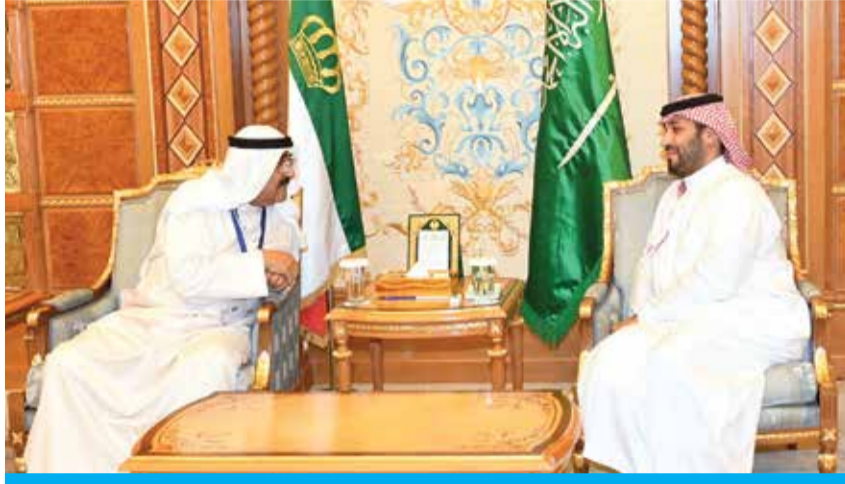
RIYADH: His Highness the Amir Sheikh Mishal Al-Ahmad Al-Jaber Al-Sabah receives Saudi Arabia's Crown Prince and Prime Minister Mohammed bin Salman Al-Saud.

Sheikh Mishal receives dignitaries, discusses ties