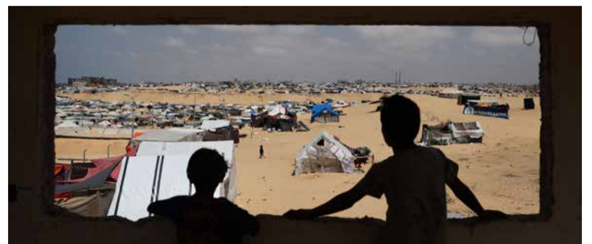
GAZA: Palestinian children stand in a camp for displaced people in Rafah in the southern Gaza Strip by the border with Egypt on April 28, 2024.

On the side of a tent in Rafah on the weekend, a Palestinian wrote a message to the thousands of pro-Palestinian protesters on US university campuses. "Thank you, students in solidarity with Gaza, your message has reached," it read. In the Zionist entity, protesters have regularly taken to the streets, including at a heated rally in Tel Aviv late Saturday demanding that Netanyahu strike a