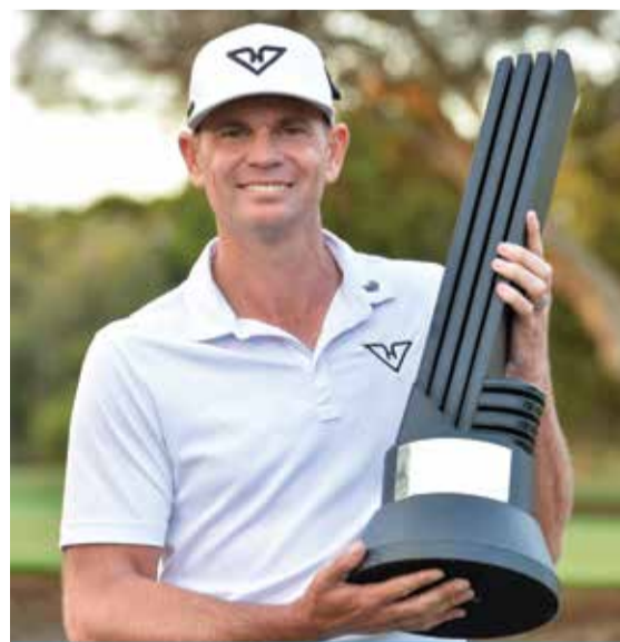
ADELAIDE: Brendan Steele of the US celebrates with the winner's trophy after the final round of LIV Golf Adelaide at the Grange Golf Club in Adelaide on April 28, 2024.

"He went through every part of my game and said 'you just need to start believing in it.' "And I thought