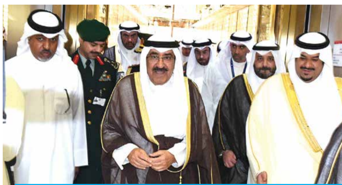
RIYADH: His Highness the Amir Sheikh Mishal Al-Ahmad Al-Jaber Al-Sabah arrives in Saudi Arabia on Sunday.

Earlier, His Highness the Amir received the Saudi Crown Prince and Prime Minister Mohammed bin