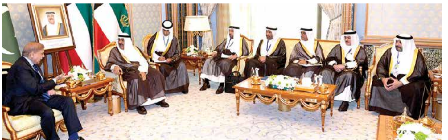
RIYADH: HH the Amir receives Pakistan's Prime Minister Mian Mohammad Shehbaz Sharif and his accompanying delegation on Sunday.