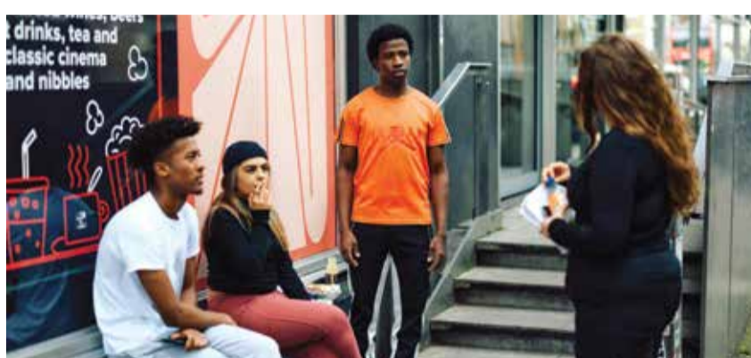
Members of the Phosphoros Theatre, gather during a break at the Rich Mix arts center in London.