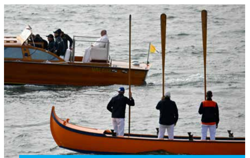
VENICE: Pope Francis is seen on a boat on April 28, 2024.

ed the prestigious festival, which began last weekend. Francis also addressed young people outside the Basilica di Santa Maria della Salute, arriving to the landmark church at the opening of the Grand Canal by speedboat. He encouraged them to become engaged in the world despite everyone being "on their own with their cell phone, glued to social media and video games".