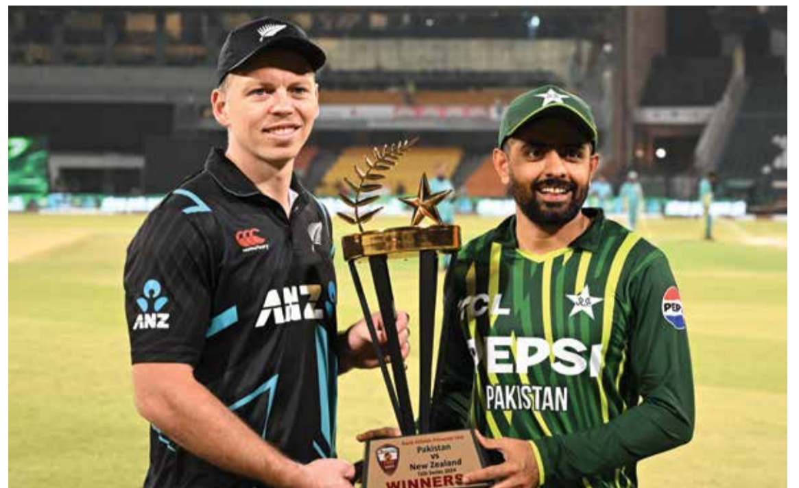
LAHORE: Pakistan's captain Babar Azam (R) and New Zealand's captain Michael Bracewell pose with the trophy after draw T20I series at the end of fifth and last Twenty20 international cricket match between Pakistan and New Zealand at the Gaddafi Cricket Stadium in Lahore.