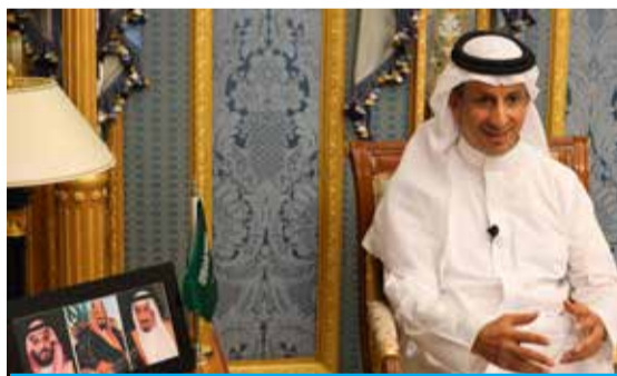
RIYADH: Saudi Arabia's Minister of Tourism Ahmed Al-Khateeb speaks during an interview on the sidelines of the World Economic Forum Special Meeting on April 28, 2024.

He was referring to the Houthis' campaign of drone and missile attacks targeting ships in the Red Sea and Gulf of Aden that the rebels say are linked to the Zionist entity. "All of our projects in the Red Sea or NEOM are in the middle and north of the Red Sea, far away from the conflict, and it is definitely not a target for the Houthis," Khateeb said.