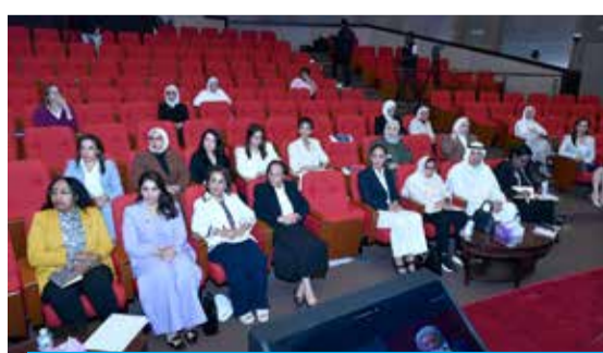
KUWAIT: The Women Against Corruption Forum being held in Kuwait.

KUWAIT: The Women Against Corruption Forum, which was launched Sunday in cooperation between the Public Authority for Anti-Corruption (Nazaha) and the Women's Cultural and Social Society highlighted the role of women in combating and preventing corruption. The forum was hosted by the Kuwait National Library jointly with its United Nations branch in Kuwait. A number of Kuwaiti public associations and faculty members from various educational institutions participated in the forum.