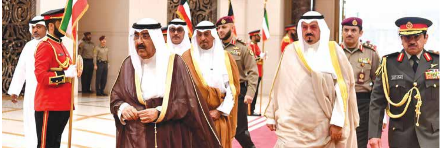
KUWAIT: His Highness the Amir Sheikh Mishal Al-Ahmad Al-Jaber Al-Sabah departs for Saudi Arabia on Sunday to attend the World Economic Forum.