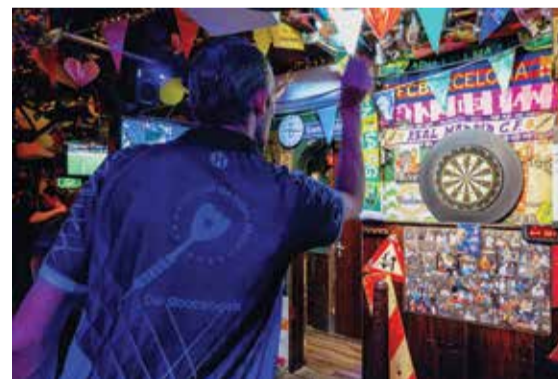
A darts player of the De Sloopkogels visiting team throws a dart.