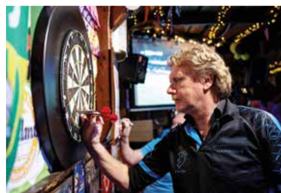
A darts player of the De Sloopkogels visiting team takes off a dart from the board.