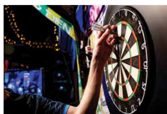
A darts player of the De Sloopkogels visiting team takes off a dart from the board.

darts, play in a darts team," the 35-year-old told AFP. "I think we started with two teams. We have 14 right now and a couple of the teams have a waiting list," she added. Competitive darts is played almost every night at Bar Club 188. Players warm up to the strains of Survivor's "Eye of the Tiger" to get the juices flowing. — AFP