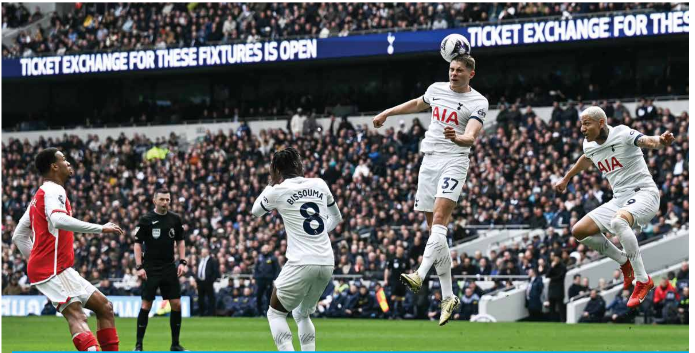
LONDON: Tottenham Hotspur's Dutch defender #37 Micky van de Ven (2nd R) heads the ball during the English Premier League football match between Tottenham Hotspur and Arsenal at the Tottenham Hotspur Stadium in London.

LONDON: Arsenal held on for a pulsating 3-2 win over arch rivals Tottenham in the north London derby to keep their grip on top spot in the Premier League on Sunday. Bidding to stay one step ahead of Manchester City in the title race, Mikel Arteta's side silenced the Tottenham Hotspur Stadium with a three-goal blast before half-time.