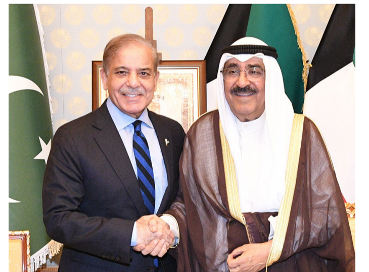
RIYADH: HH the Amir Sheikh Mishal Al-Ahmad Al-Jaber Al-Sabah receives Saudi Crown Prince and Prime Minister Mohammed bin Salman Al-Saud (left), Iraqi Prime Minister Mohammed Al-Sudani (center) and Pakistani Prime Minister Shehbaz Sharif (right) on the sidelines of the World Economic Forum special meeting on April 28, 2024. (See Page 2)