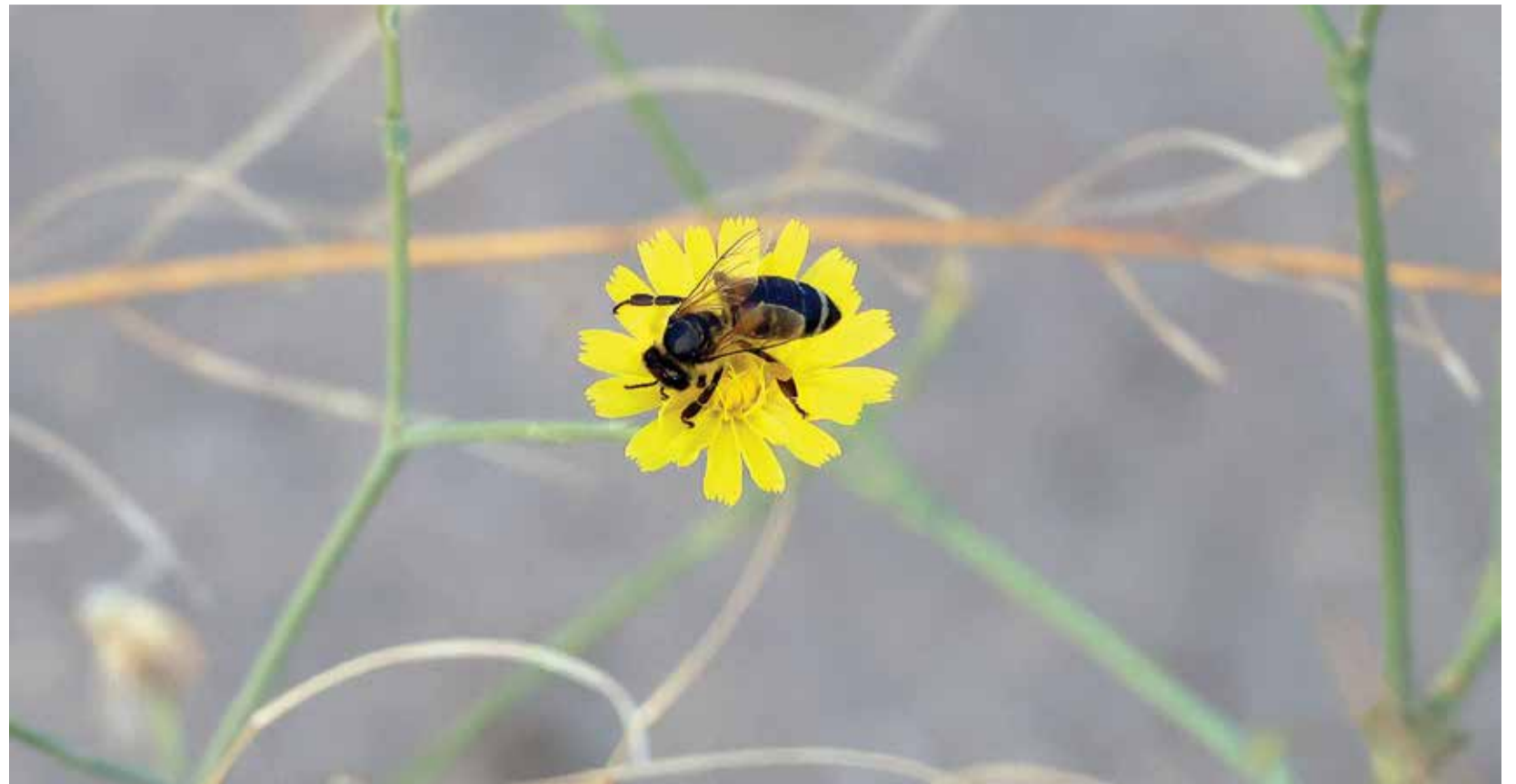
A honeybee draws nectar from a flower.