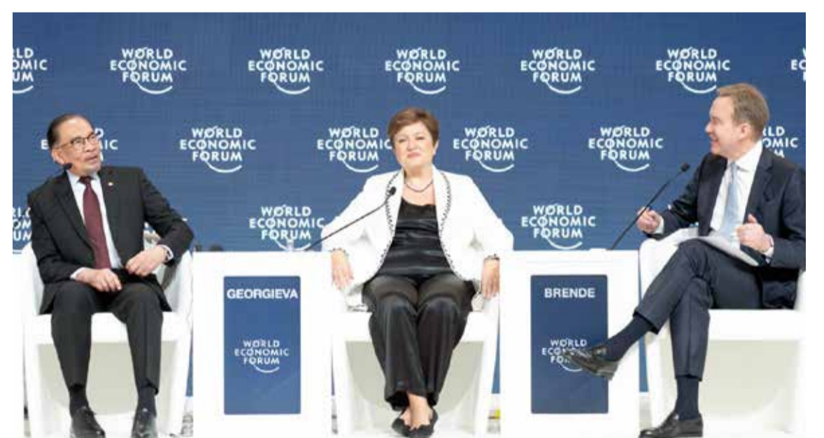
RIYADH: Director of the International Monetary Fund Kristalina Georgieva during the World Economic Forum sessions.

A young generation is using TikTok as a search engine of sorts, making queries as they might on Google and seeing what the algorithm serves up, said SOCi di-