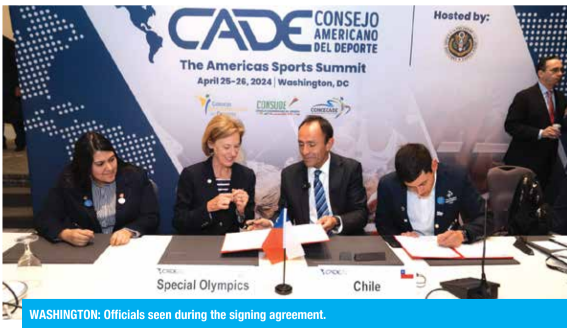
WASHINGTON: Officials seen during the signing agreement.

Rice set up the needlessly tense finale for Arsenal with a rash foul on Davies, conceding a penalty that Son drilled past Raya in the 87th minute. In Sunday's other early kick-off, Bournemouth beat Brighton 3-0 through goals from Marcos Senesi, Enes Unai and Justin Kluivert. — AFP