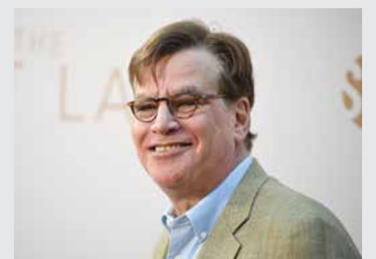
US playwright Aaron Sorkin attends Showtime's NYC event and premiere for "The First Lady" at the DGA Theater Complex in Los Angeles, April 14, 2022.

Sorkin, who also created TV's "The West Wing" and movie "The Trial of the Chicago 7", revealed the nascent project during a live recording of "The Town" podcast this week. He accused Mark Zuckerberg—co-founder, and chief executive of Facebook parent company Meta—of prioritizing growth at the expense of integrity, despite his already enormous personal wealth. "Facebook has been, among other things, tuning its algorithm to promote the most divisive material possible because that is what will increase engagement," he said. "That is what will get you to what they call in-