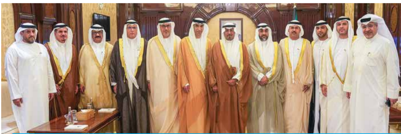
KUWAIT: His Highness the Prime Minister Sheikh Dr Mohammad Sabah Al-Salem Al-Sabah receives at Bayan Palace on Sunday, UAE Minister of State for Foreign Trade Dr Thani bin Ahmad Al-Zeyoudi and his accompanying delegation, on his visit to the country.

KUWAIT: His Highness the Prime Minister Sheikh Dr Mohammad Sabah Al-Salem Al-Sabah received at Bayan Palace on Sunday, UAE Minister of State for Foreign Trade Dr Thani bin Ahmad Al-Zeyoudi and his accompanying dele-