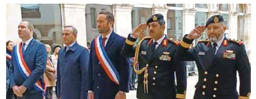
PARIS: Kuwait has bestowed upon a group of French Gulf War veterans an honorary order in recognition of their contributions towards liberation from Iraqi invasion.