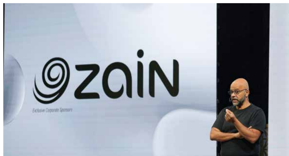
Gawdat is a leading expert on tech and AI.