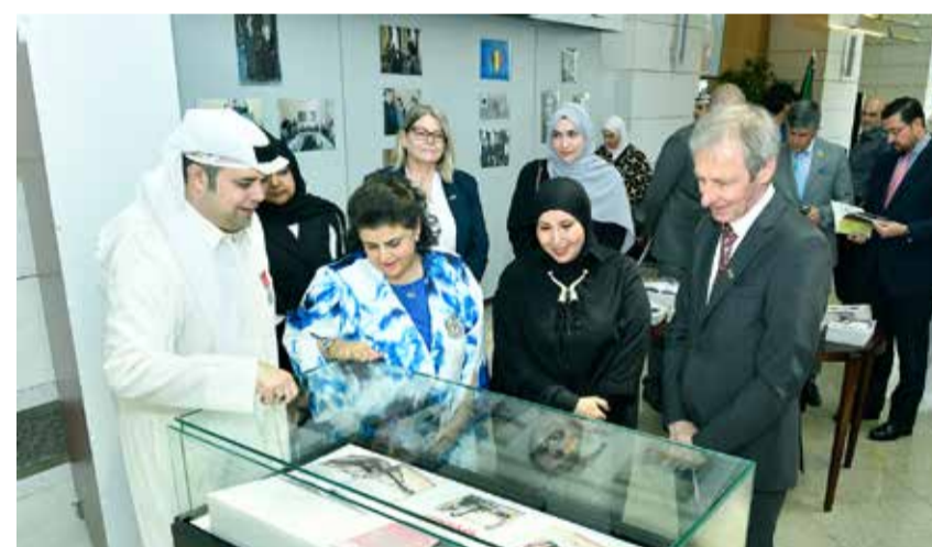
Guests take a tour of the exhibition.