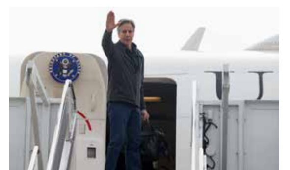
MARYLAND: US Secretary of State Antony Blinken gestures as he departs Joint Base Andrews for Saudi Arabia on April 28, 2024.

It also comes as Americans prepare to vote in November on whether to give the 81-year-old Biden a second term, an election process that could scramble what progress has been made on Saudi-Zionist normalization so far. In September, before Hamas' Oct 7 attack on the Zionist entity, Saudi Crown Prince Mohammed bin Salman told Fox News that "every day we get closer" to a deal that could also bolster