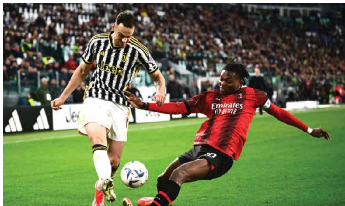
TURIN: AC Milan's Portuguese forward #10 Rafael Leao fights for the ball with Juventus' Italian defender #04 Federico Gatti (L) during the Italian Serie A football match between Juventus and AC Milan at The Allianz Stadium in Turin.

Earlier Matteo Pessina's 96th minute penalty