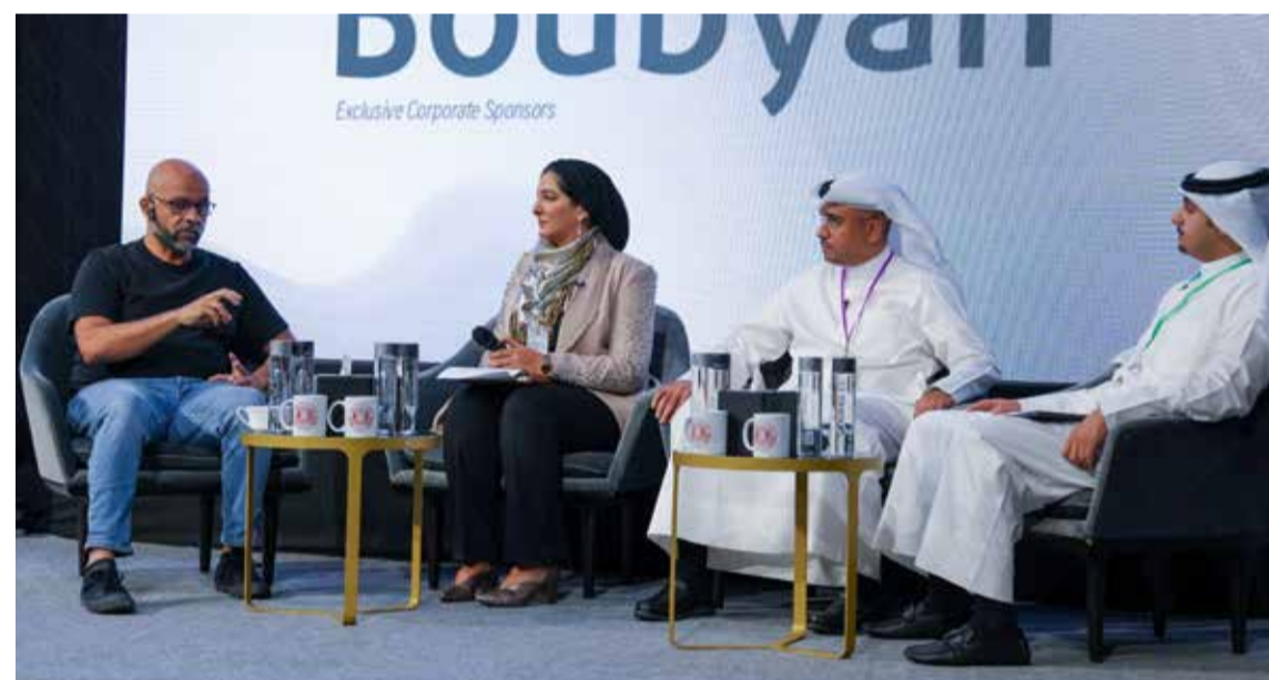
Zain joined the stage to shed light on AI's impact on the business landscape.

services and 5.5G network automation in the region. Zain continues to reinforce its efforts to further push AI-enabled innovative services and 5.5G network automation. The company strongly believes in the pivotal role AI tools and applications play in transforming networks, ultimately improving performance, efficiency, optimization, operations, and maintenance.