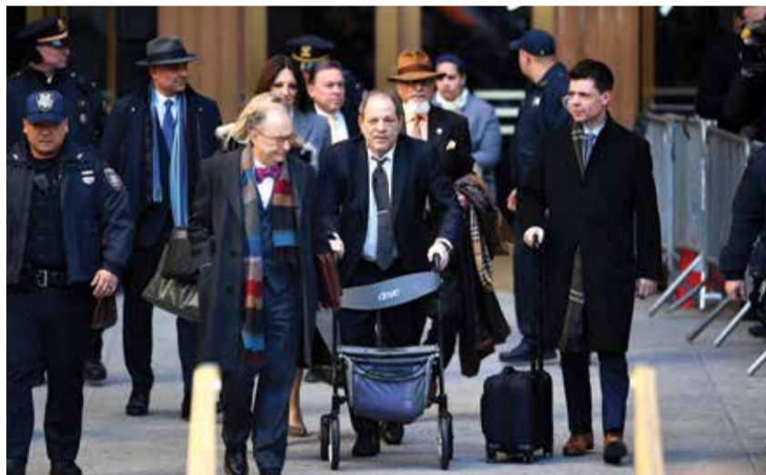
Harvey Weinstein leaves the Manhattan Criminal Court, as a jury continues with deliberations on February 21, 2020, in New York City.

Bombshell allegations broke against the Oscar-winning producer in 2017, launching the #MeToo movement that paved the way for women to fight back against sexual violence