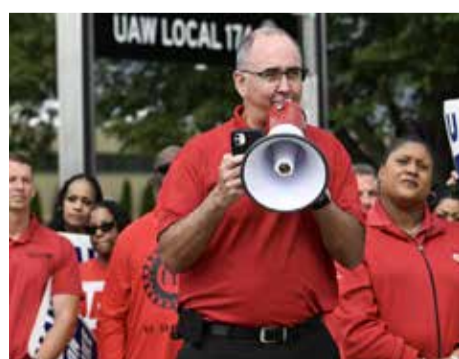
WASHINGTON: A tentative agreement between the United Auto Workers and Daimler Truck was forged just minutes before a contract was to expire at midnight for workers who build long-haul trucks and buses.

A strike would have affected four industrial sites in North Carolina and one each in Tennessee and Georgia. The plants make Freightliner and Western Star trucks