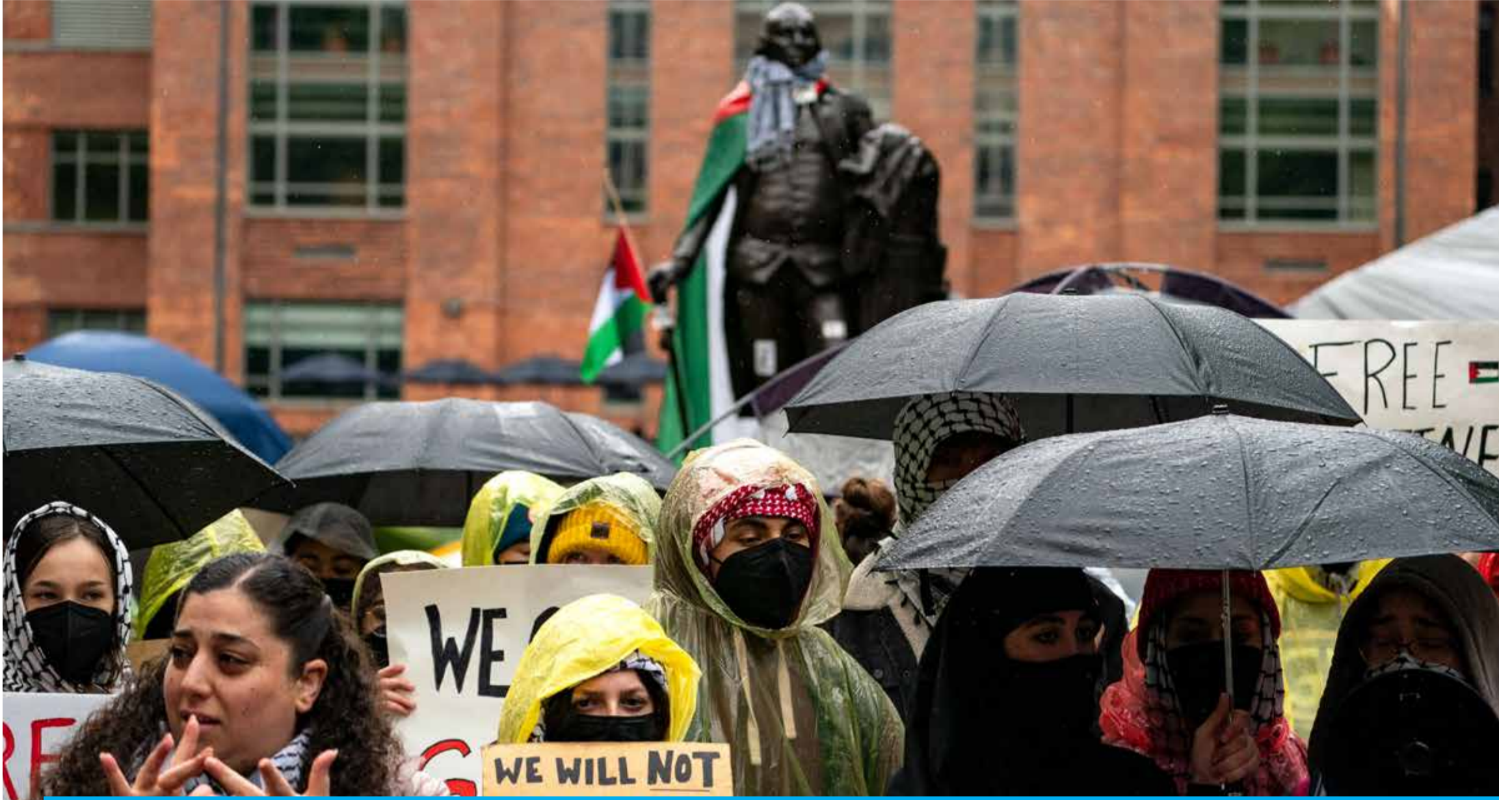
WASHINGTON: A statue of George Washington is seen draped in a flag of Palestine and a keffiyeh as activists and students protest near an encampment at University Yard at George Washington University on April 27, 2024.