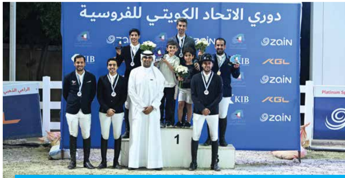
Kuwait's national showjumping team