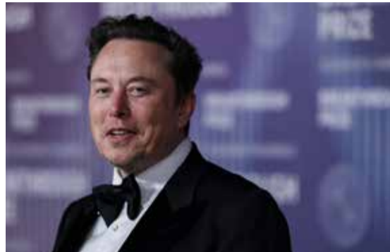
LOS ANGELES: Tesla CEO Elon Musk arrives at the Tenth Breakthrough Prize Ceremony at the Academy Museum of Motion Pictures in Los Angeles, California.

CCTV quoted him as praising the "hardworking and intelligent Chinese team" at his Tesla Gigafactory in Shanghai during his meeting with Li. "Tesla