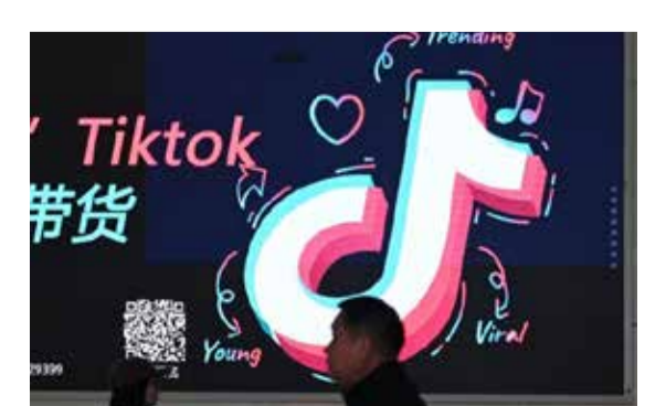
People walk past an advertisement featuring the TikTok logo at a train station in Zhengzhou, in China's central Henan province on January 21, 2024.

Monetary Fund stressed the necessity and importance of unleashing the power of technology and linking it to human capital, which can move between different opportunities and jobs more flexibly. The special meeting of the World Economic Forum held in Riyadh will witness many dialogues and discussion sessions aimed at strengthening international cooperation efforts and stimulating joint efforts to innovate sustainable solutions. — KUNA