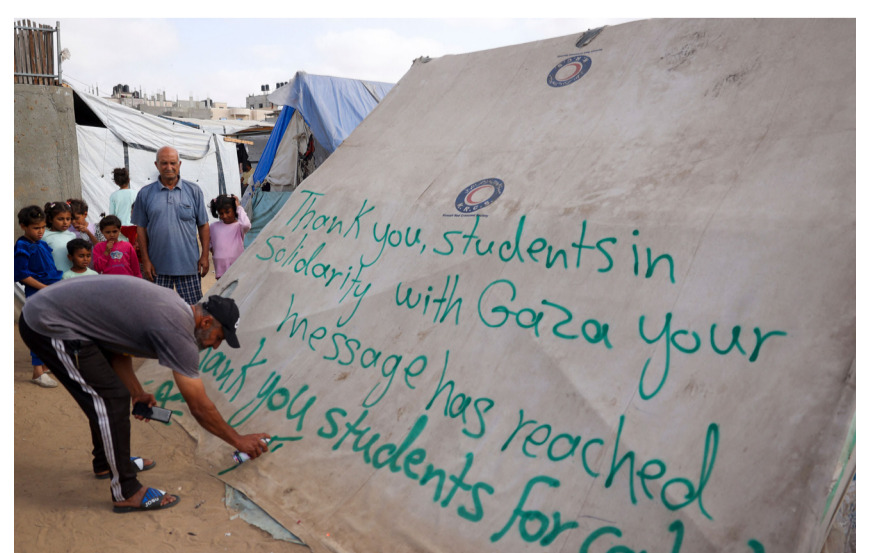
GAZA: A man writes a message of thanks to students in the US protesting in solidarity with the people of Gaza on a tent at a camp for displaced Palestinians in Rafah in the southern Gaza Strip on April 27, 2024.