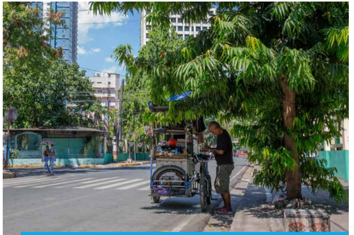
MANILA: A vendor stands under a tree during hot weather on April 28, 2024. — AFP

Global temperatures hit record highs last year, and the United Nations' weather and climate agency said Tuesday that Asia was warming at a particularly rapid pace. The Philippines ranks among the countries most vulnerable to the impacts of climate change. — AFP