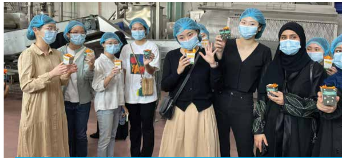
KU students during the visit.