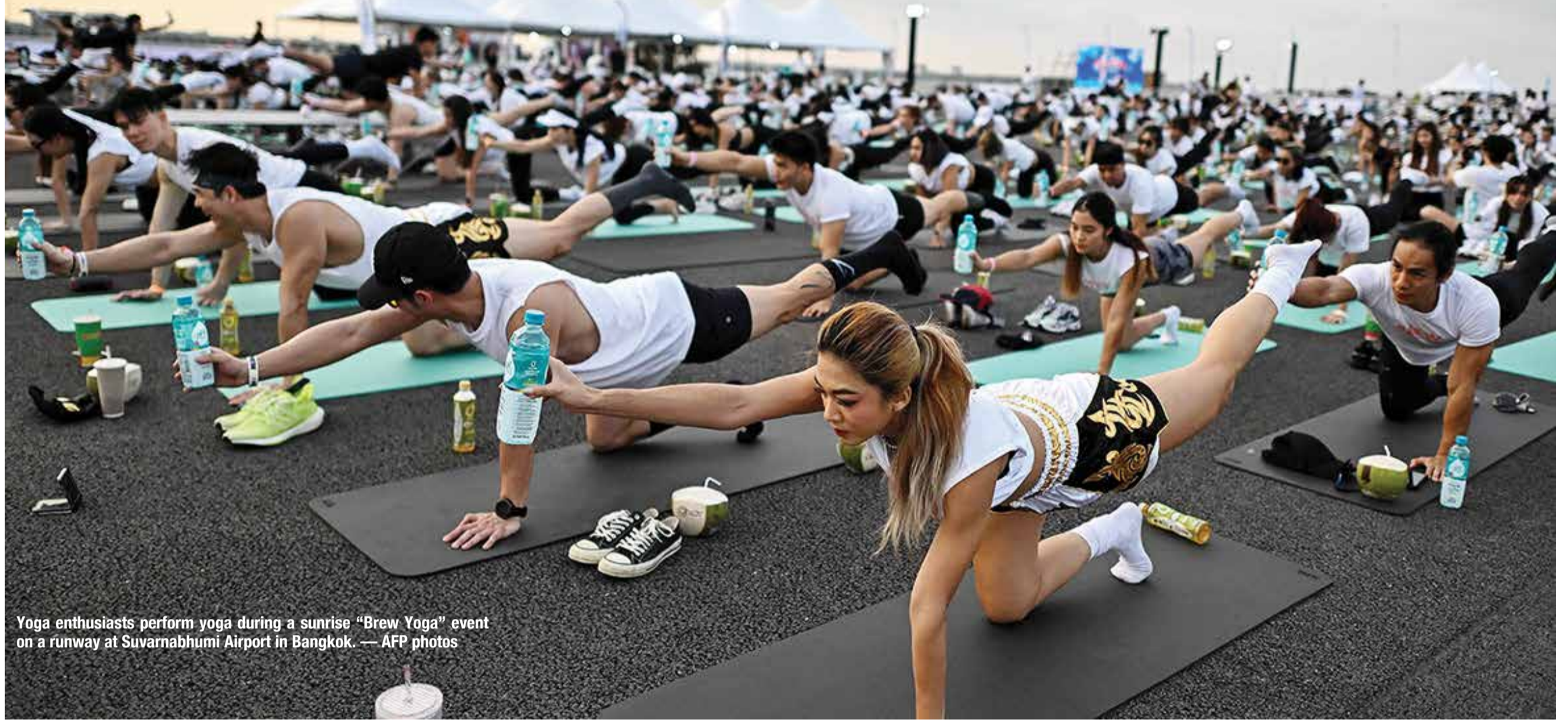
Yoga enthusiasts perform yoga during a sunrise "Brew Yoga" event on a runway at Suvarnabhumi Airport in Bangkok.

Stretching their fingertips to the reddening sky, hundreds of yoga devotees rolled out their mats on the runway of Bangkok's main airport Saturday, practicing their downward dog as early morning flights rumbled overhead. The unusual event on the airport's third runway - which is still under construction - saw the workout paired with beverages as participants were offered coconuts, iced teas and water to incorporate into their routines. Some 500 yoga-goers and camera-ready influencers began arriving at 5:00 am, making their way in the dark to their mats on the runway.