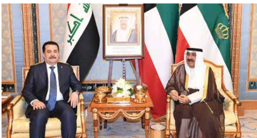
HH the Amir receives Iraq's Prime Minister Mohammed Al-Sudani.