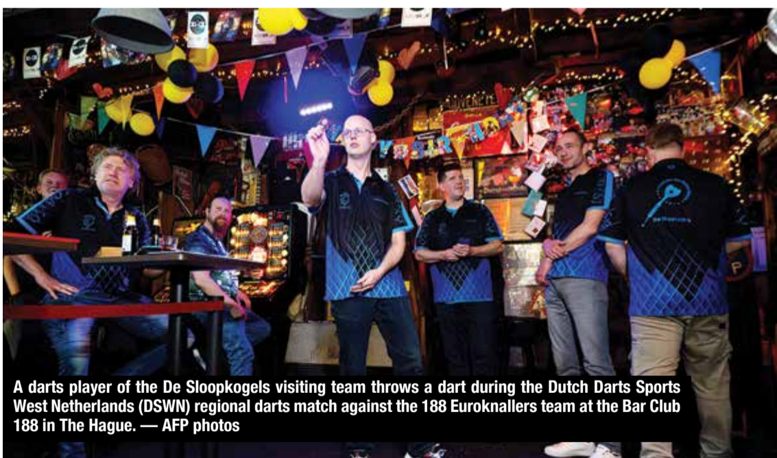
A darts player of the De Sloopkogels visiting team throws a dart during the Dutch Darts Sports West Netherlands (DSWN) regional darts match against the 188 Euroknallers team at the Bar Club 188 in The Hague.