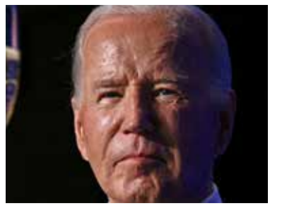
Biden takes Trump to task at White House correspondents' dinner