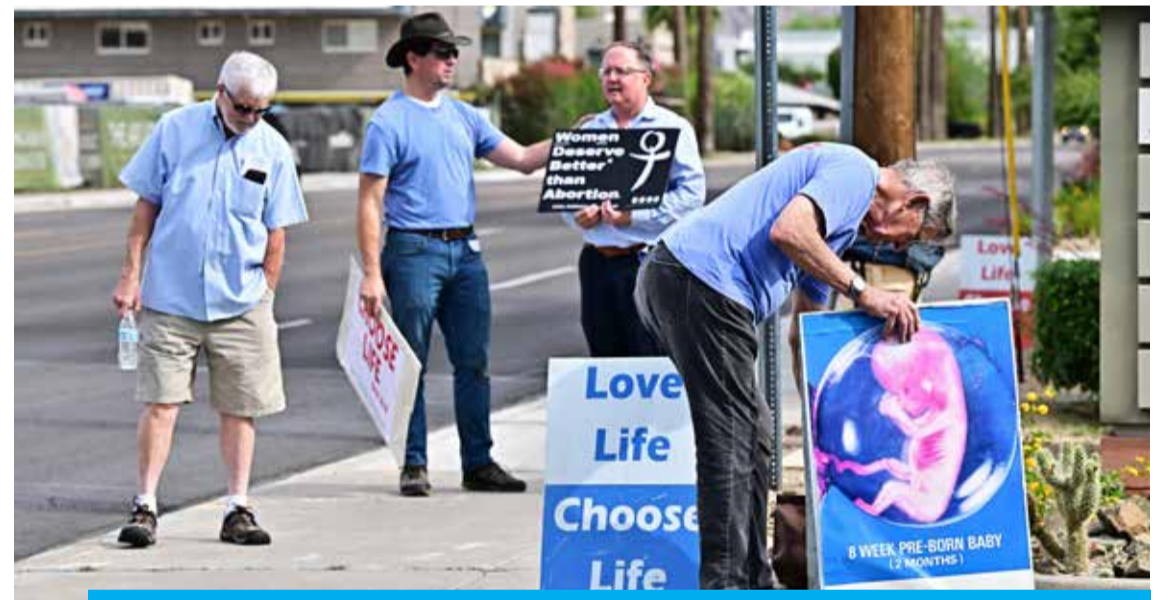
PHOENIX: Pro-life activists place signs in front of Camelback Family Planning, an abortion clinic, on April 18, 2024.