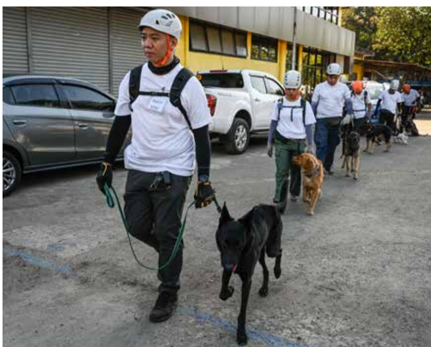
Participants and their dogs taking part in a search and rescue program in Taguig, metro Manila.