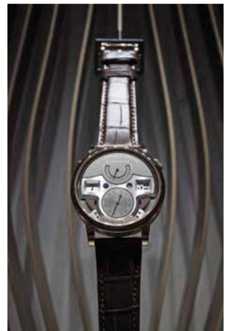
a watch by German manufacturer of luxury and prestige watches A Lange & Sohne.