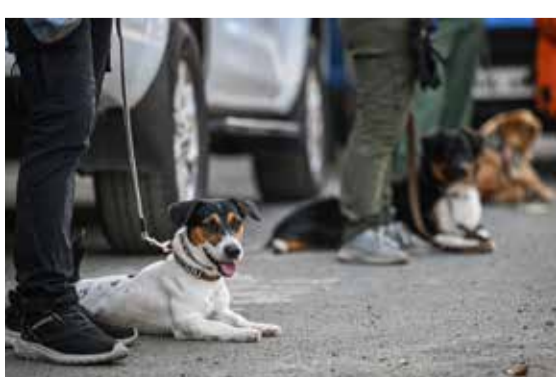
Participants and their dogs taking part in a search and rescue program.