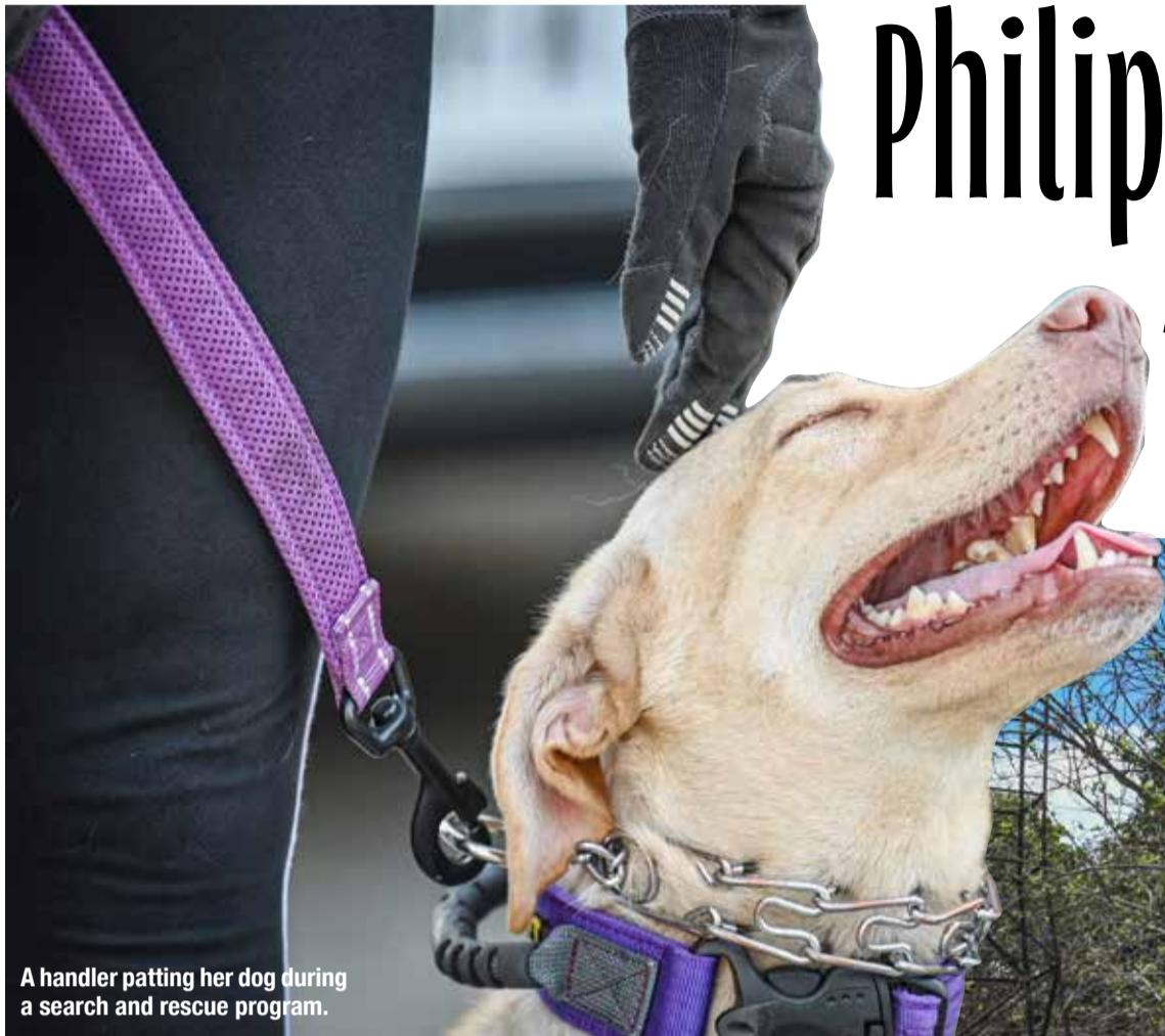
A handler patting her dog during a search and rescue program.

W ith her owner holding her leash, Philippine pooch Hazel sniffs through rubble in a simulated search for survivors of a major earthquake in the capital Manila.