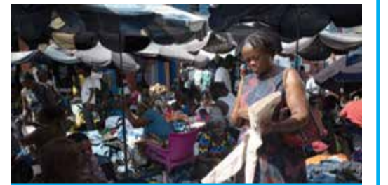
ACCRA: A buyer looks at secondhand clothes at the Kantamanto market in Accra, Ghana. — AFP

The country has, along with other African states, also been hard hit by economic fallout from the coronavirus pandemic as well as the Russia-Ukraine war. According to the IMF, the aid provided to Ghana has already borne fruit in enabling Accra to set in train reforms aimed at restoring macroeconomic stability and debt sustainability while laying the groundwork for stronger and more inclusive growth. Last year Ghana successfully carried out a restructuring of its domestic debt. — AFP