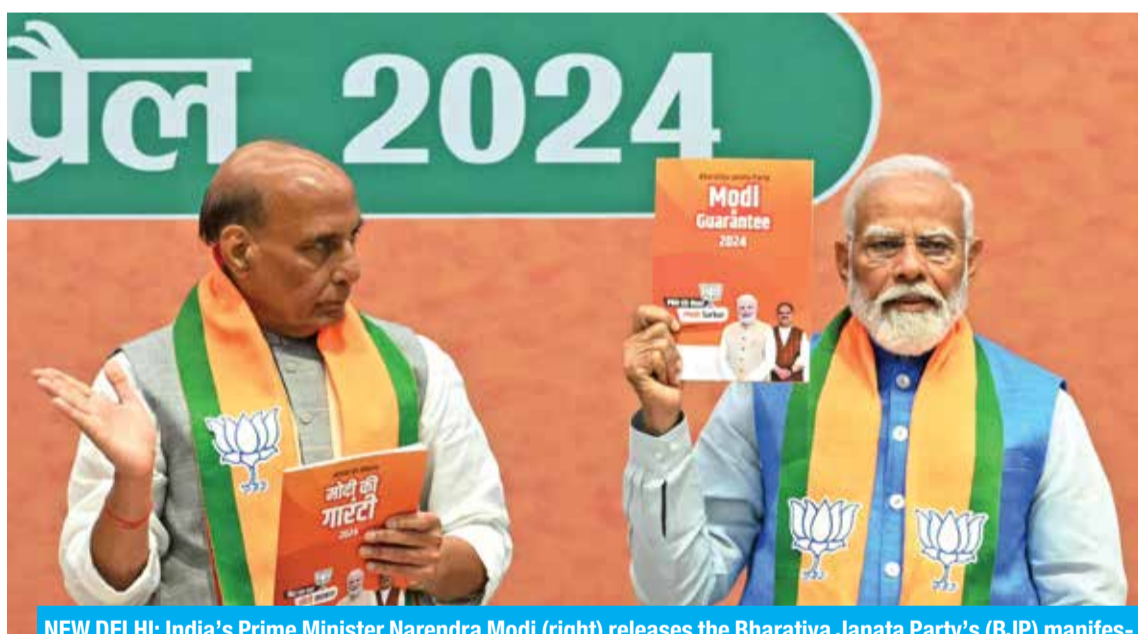
NEW DELHI: India's Prime Minister Narendra Modi (right) releases the Bharatiya Janata Party's (BJP) manifesto next to Defense Minister Rajnath Singh ahead of country's upcoming general elections.