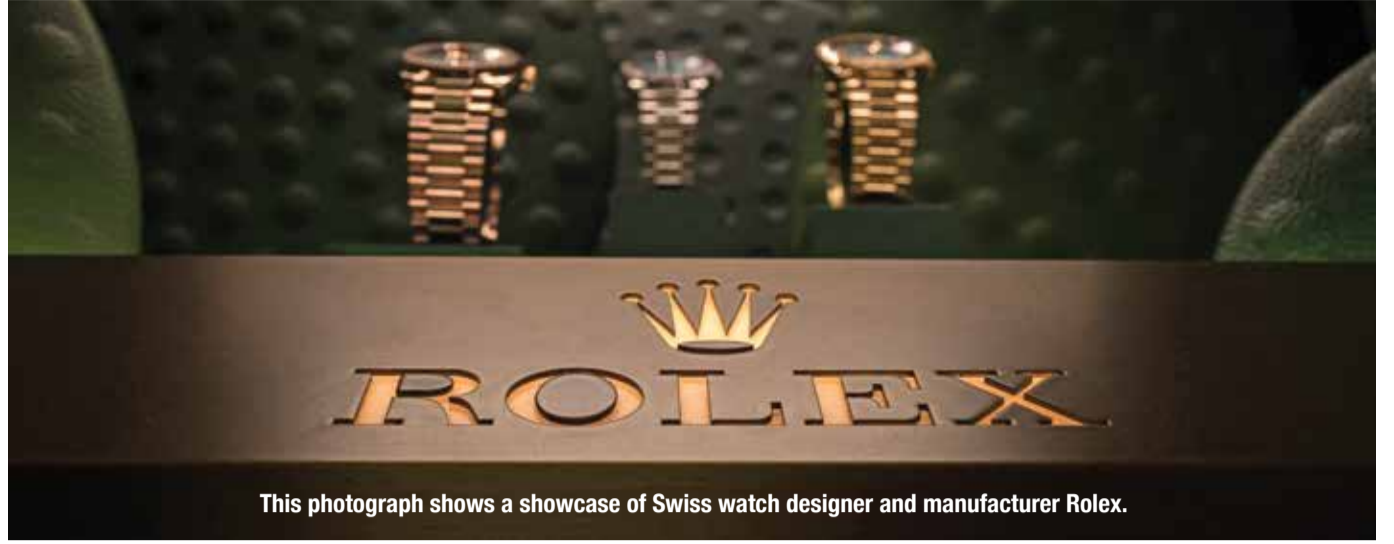
This photograph shows a showcase of Swiss watch designer and manufacturer Rolex.