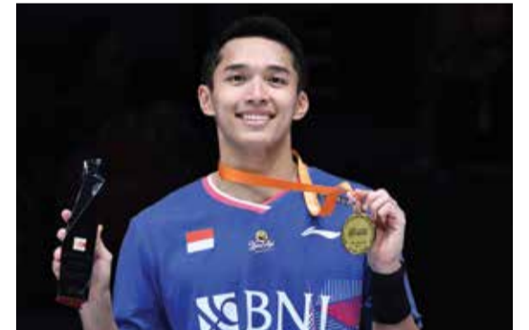
NINGBO: Indonesia's Jonatan Christie poses on the podium after winning the men's singles final match against China's Li Shifeng at the Badminton Asia Championships in Ningbo, in eastern China's Zhejiang province on April 14.

An, the top seed in Ningbo, will still be favourite to win gold at this summer's Paris Olympics but she has been struggling with a knee injury. The men's doubles title was claimed on Sunday by Chinese pair Liang Wei Keng and Wang Chang, who dispatched Malaysian duo Goh Sze Fei and Nur Izzuddin 21-17, 15-21, 21-10. South Korean partners Baek Ha-na and Lee So-hee took the women's doubles title by beating China's Zhang Shu Xian and Zheng Yu 23-21, 21-12. The prestigious annual tournament was the final chance for Asian players to seal a spot at the Olympics.