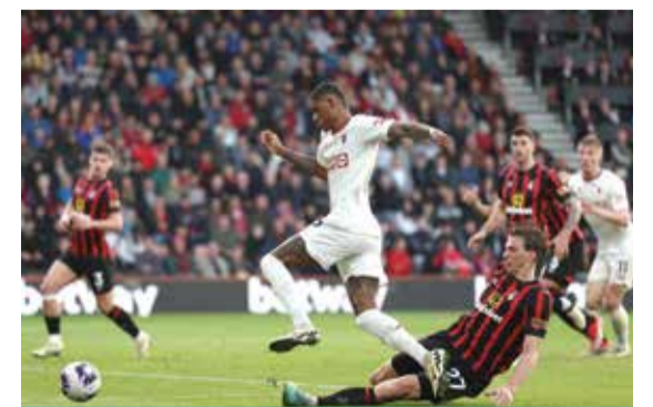
BOURNEMOUTH: Bournemouth's Ukrainian defender #27 Illia Zabarnyi (R) vies with Manchester United's English striker #10 Marcus Rashford (C) during the English Premier League football match between Bournemouth and Manchester United at the Vitality Stadium in Bournemouth, southern England.

French teenager Willy Kambwala kept his place at centre-back with Raphael Varane, Lisandro Martinez and Victor Lindelof among those absent due to injury. But Kambwala had a moment to forget for the