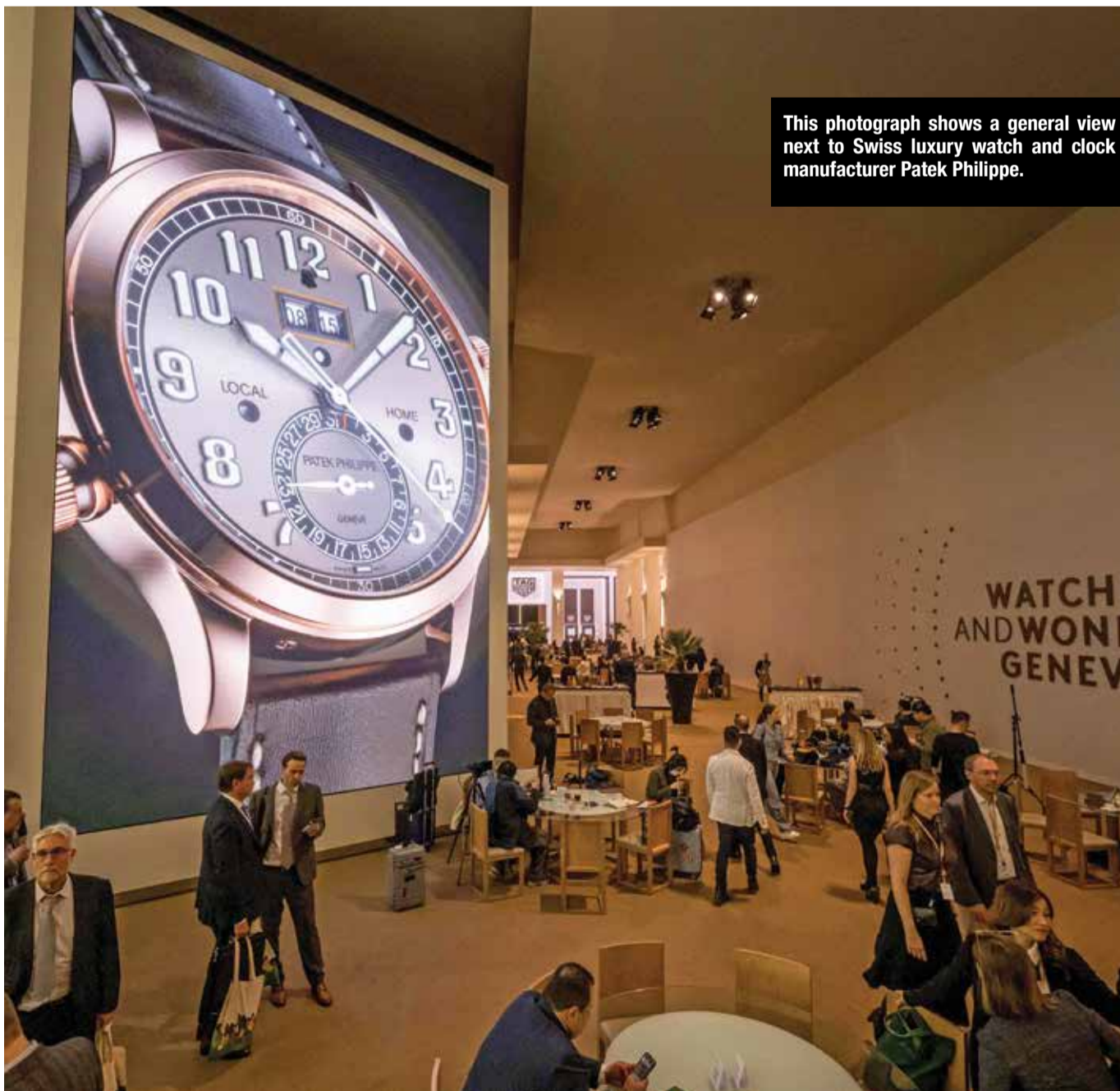
This photograph shows a general view next to Swiss luxury watch and clock manufacturer Patek Philippe.