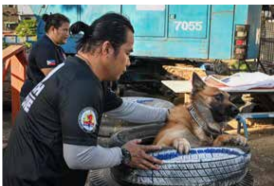
This photo shows handlers and their dogs taking part in a search and rescue program in Taguig, metro Manila.