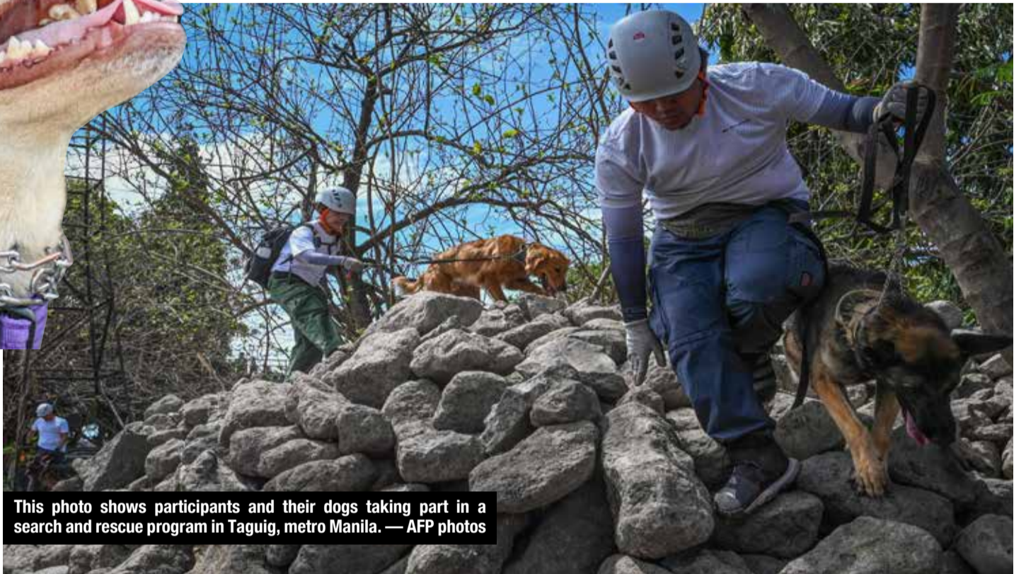
This photo shows participants and their dogs taking part in a search and rescue program in Taguig, metro Manila.