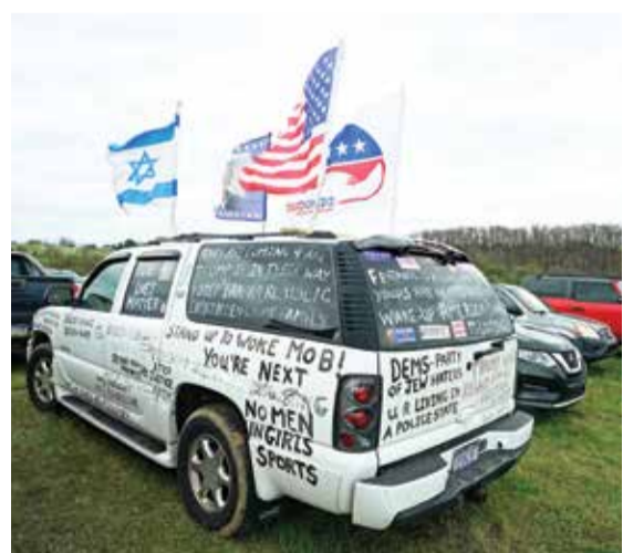
SCHNECKSVILLE: Supporters of former US President and 2024 presidential candidate Donald Trump arrive to hear him speak at a campaign rally on April 13, 2024.

Gathered in the small Pennsylvania town of Schnecksville, his impassioned backers said Saturday they believe Trump will come out of the proceedings stronger than ever. The crowd, braving a chilly wind and some light rain, started gathering Saturday morning to hear the former president speak at night as he campaign once again for the White House.