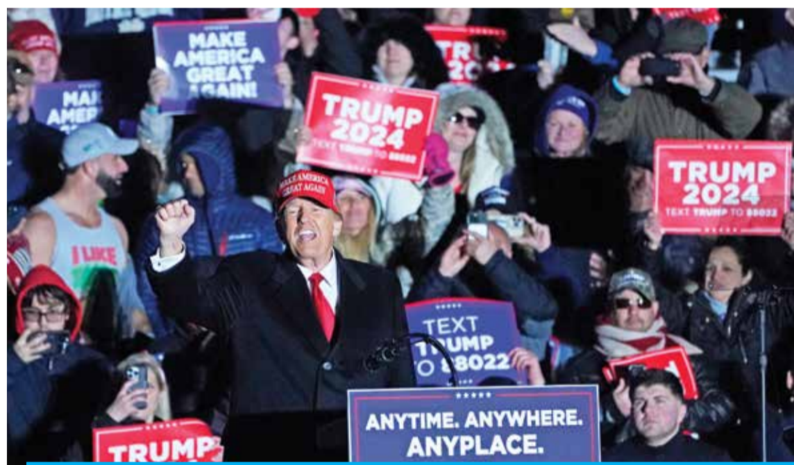
Former US president and Republican presidential candidate Donald Trump speaks at the campaign rally.

entity has killed at least 33,729 people, mostly women and children, according to the health ministry in Gaza. The Zionist entity withdrew most of its troops from the Gaza Strip on the six-month anniversary of the war, leaving only a single brigade in central Gaza, while continuing to launch air strikes and bombardments. Netanyahu has repeated his determination to launch a ground invasion of Rafah, where around 1.5 million Gazans are sheltering from the war, despite opposition from the Zionist entity's top ally the United States.—AFP