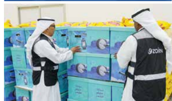
Food supplies initiative covered the needs of underprivileged families.