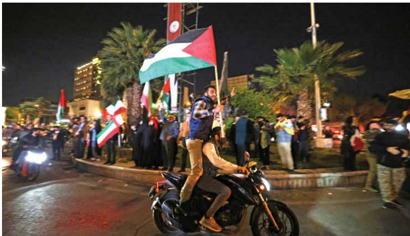
TEHRAN: Demonstrators wave Iran and Palestinian flags as they gather at Palestine Square in Tehran after Iran launched a drone and missile attack on the Zionist entity.