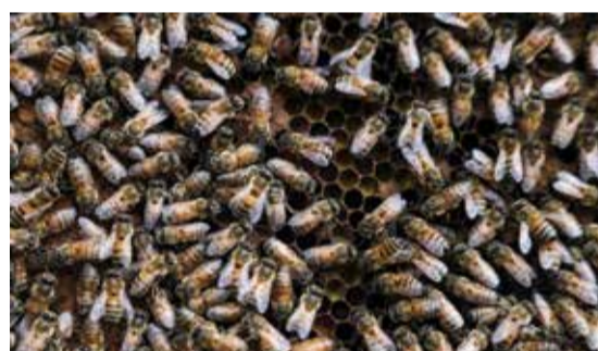
This picture shows a frame full of bees during an urban beekeeping class of Yonghe community college in New Taipei City.

Some, like Edwin Huang, see Tsai's class as a chance to make money while taking part in the "under-forest economy"—a practice of developing and selling eco-friendly products that give back to the environment. "I think keeping bees can help im-