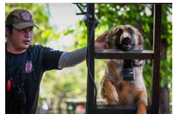
A trainer guiding a dog during a search and rescue program.

Every Sunday, around 46 mongrels and purebreds of all sizes are put through their paces by volunteer trainers at a facility in suburban Manila where they learn to find people, scale ladders, and bound over wooden structures. Philippine disaster agencies already have search and rescue dogs that are deployed when disasters strike the archipelago nation.