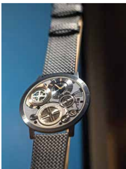
These photos show one of the World's thinnest watches that include a tourbillon movement, the two millimetres thick "Altiplano Ultimate Concept Tourbillon 150th Anniversary" by Swiss luxury watchmaker Piaget.