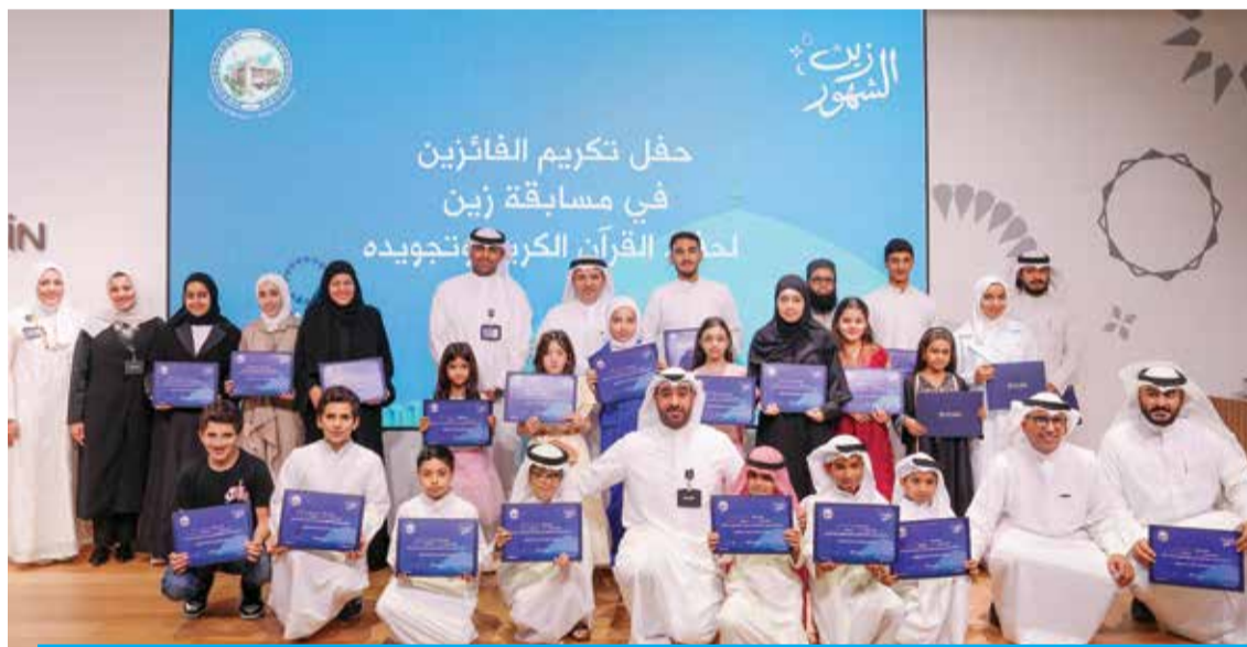
Zain's competition encouraged young people to pursue Holy Quran recitation.