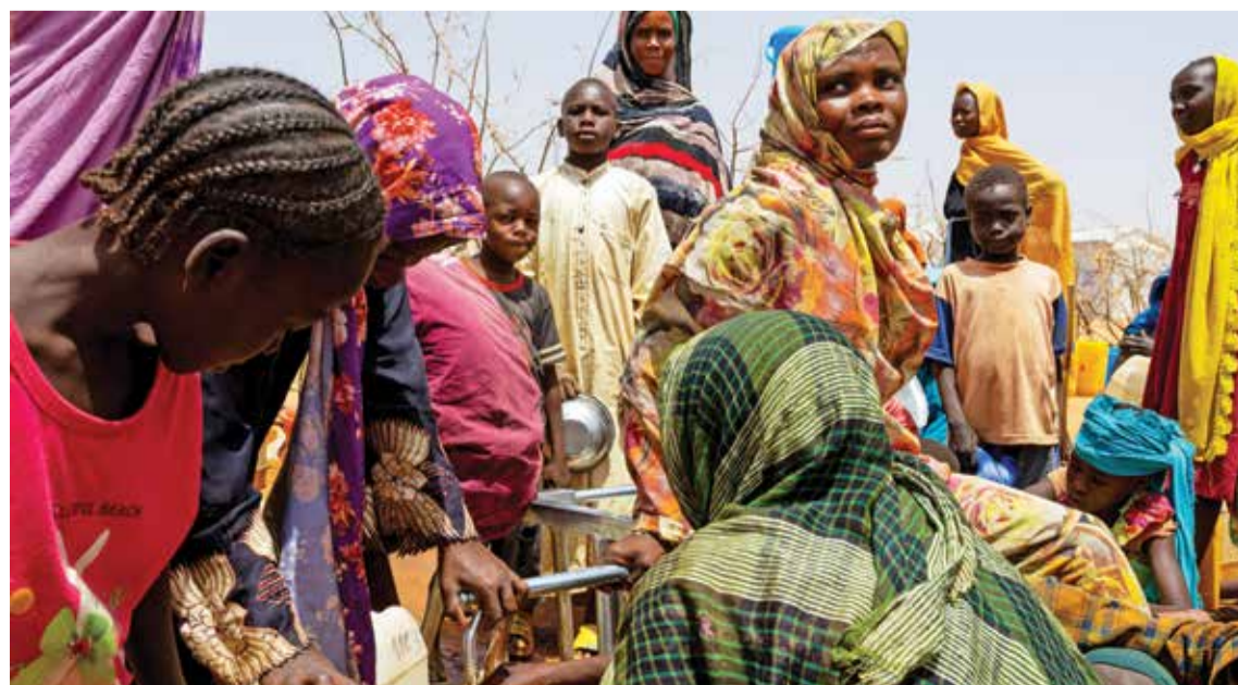
FARCHANA: Sudanese refugees gather to fill cans with water from a water point in the Farchana refugee camp, on April 8, 2024. — AFP photos

She warns of growing tensions with Chadian residents of Farchana. "There isn't enough water or food for everyone," she said. The region's governor complains of a lack of international action. "There are more and more outbursts, and we've asked for more gendarmes," Bachar Ali Souleymane told AFP. "When we see the humanitarian attention in Ukraine or Palestine, we feel like we've been forgotten." — AFP