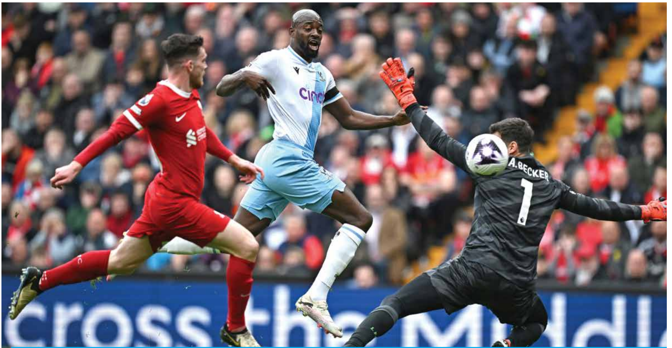
LIVERPOOL: Crystal Palace's French striker #14 Jean-Philippe Mateta (C) shoots past Liverpool's Brazilian goalkeeper #01 Alisson Becker (R) but Liverpool's Scottish defender #26 Andrew Robertson (L) clears off the line during the English Premier League football match between Liverpool and Crystal Palace at Anfield in Liverpool.