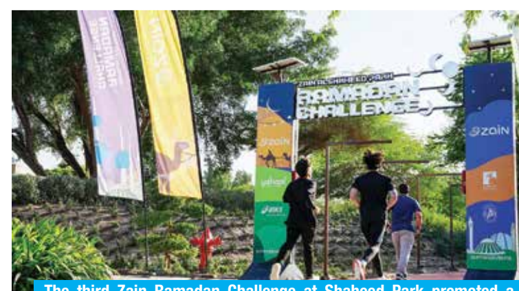
The third Zain Ramadan Challenge at Shaheed Park promoted a healthy and active lifestyle.