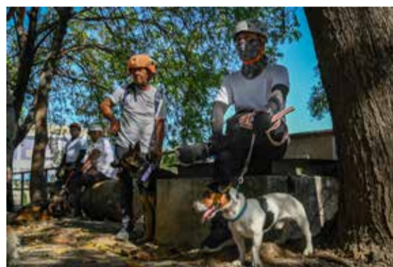
This photo shows participants and their dogs taking part in a search and rescue program in Taguig, metro Manila.