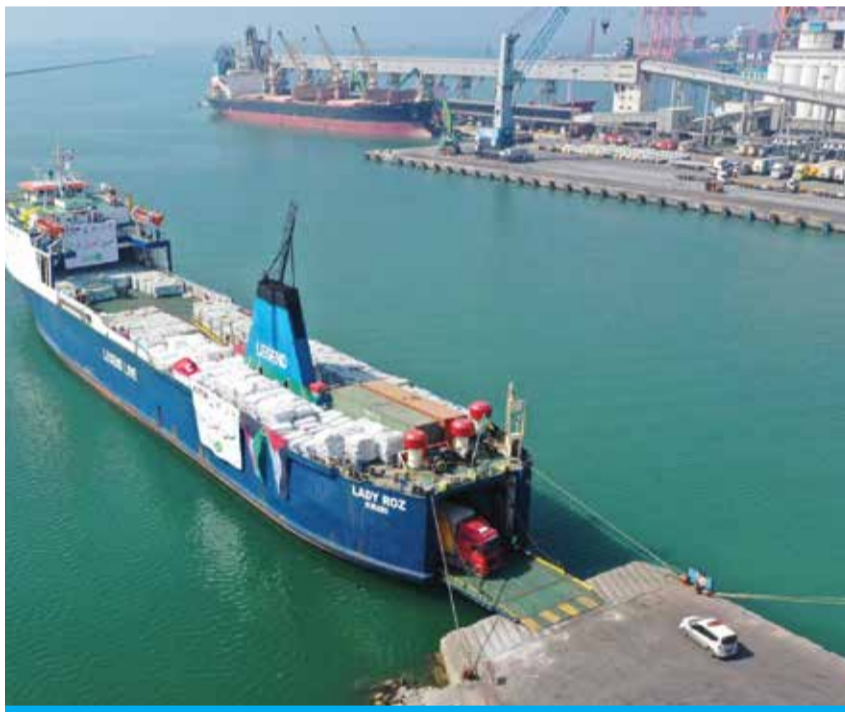
Gaza relief ship