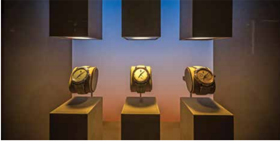
This photograph shows watches of Swiss luxury watchmakers Parmigiani during the opening day of the "Watches and Wonders Geneva" luxury watch fair in Geneva.