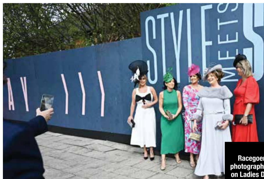
Racegoers pose for a photograph as they attend on Ladies Day, the second day of the Grand National Festival horse race meeting at Aintree Racecourse in Liverpool, north-west England.