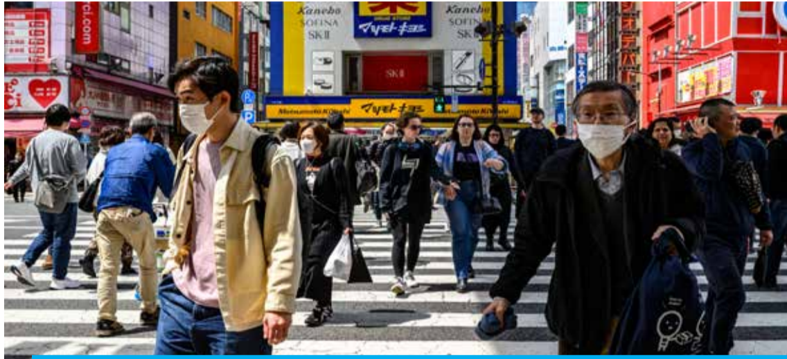
TOKYO: People walk in the shopping area of Tokyo's Akihabara district.

595,000 to 124 million in 2023, marking the 13th straight annual fall, according to government data released Friday. The scale of the decrease was offset by an inflow of foreigners, the data showed, while