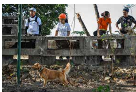
Participants and their dogs taking part in a search and rescue program in Taguig, metro Manila.