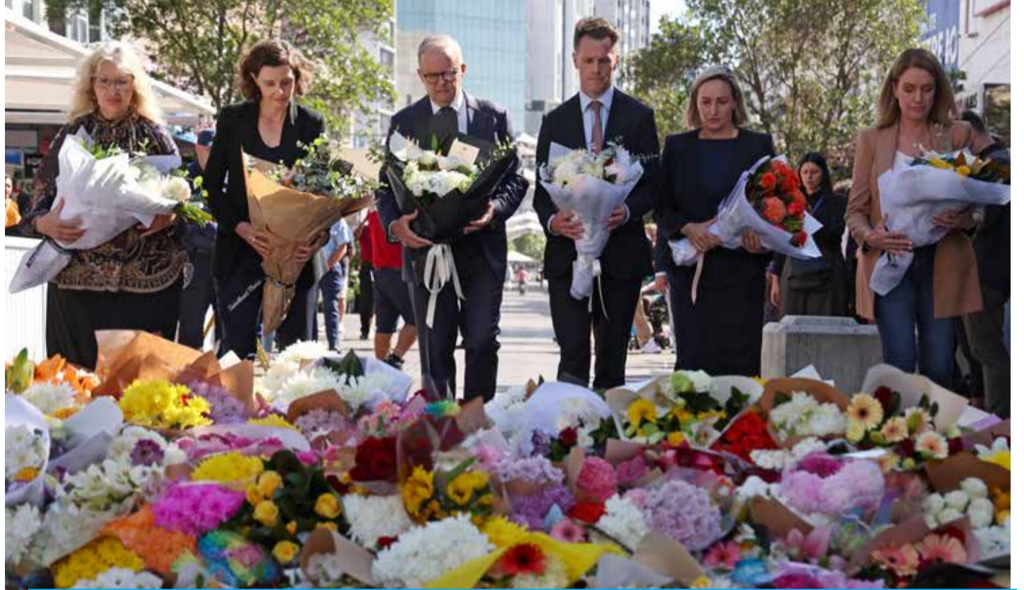
SYDNEY: Australian Prime Minister Anthony Albanese (center) stands with other officials as they prepare to leave flowers outside the Westfield Bondi Junction shopping mall in Sydney on April 14, 2024.

He had been living in a vehicle and hostels, and was only in sporadic contact with his family via text messages, his parents said. A Facebook profile said Cauchi came from Toowoomba, near Brisbane, and had attended a local high school and university. A distinctive grey, red and yellow dragon tattoo on