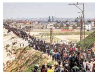
Hamas, Zionist entity exchange recriminations over stalled Gaza talks