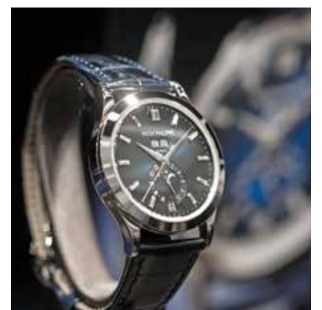
A watch displayed at the stand of Swiss luxury watch and clock manufacturer Patek Philippe.