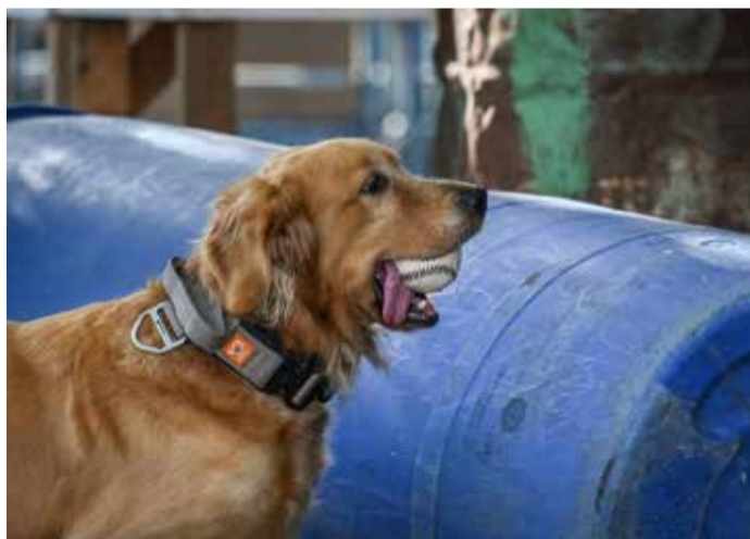
A dog carrying a reward toy during a search and rescue program.

It aims to train at least 3,400 pet dogs in search and rescue across the city. "We