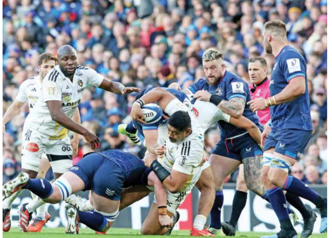
DUBLIN: La Rochelle's Australian lock Will Skelton (C) is tackled during the European Rugby Champions Cup quarter-final rugby union match between Leinster and Stade Rochelais at Aviva stadium in Dublin. — AFP

Northampton ran in nine tries at Franklin Gardens to rout the Bulls of South Africa to make the semi-finals for the first time since 2011. The under-strength Bulls left out big names such as Willie le Roux, Canan Moodie and Kurt-Lee Arendse while blaming injuries and an epic journey from Pretoria via eight different airlines for the omissions. — AFP