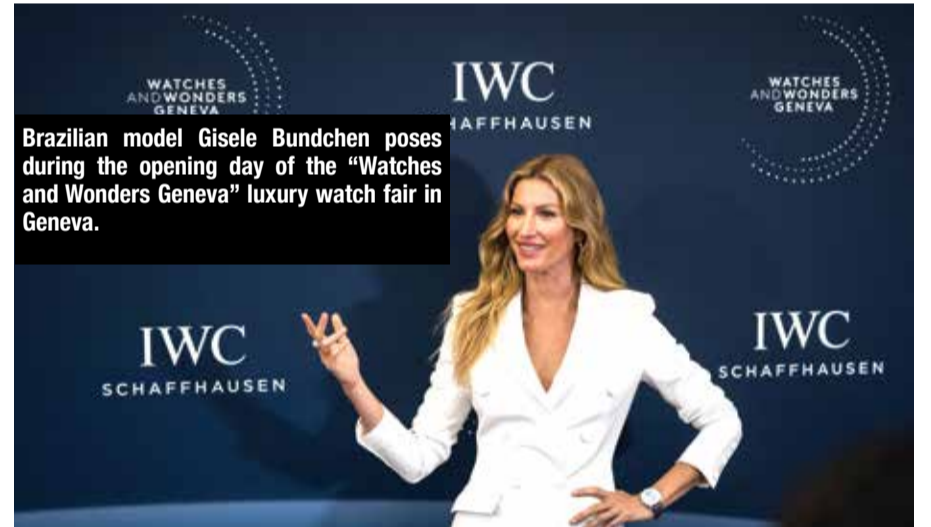
Brazilian model Gisele Bundchen poses during the opening day of the "Watches and Wonders Geneva" luxury watch fair in Geneva.