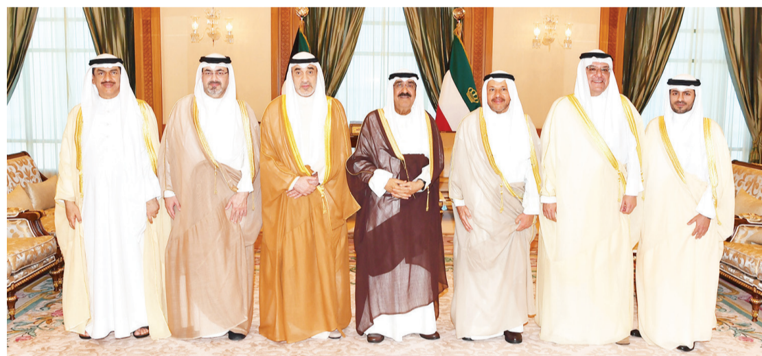
KUWAIT: HH the Amir Sheikh Mishal Al-Ahmad Al-Jaber Al-Sabah received at Seif Palace on Sunday Deputy PM, Defense Minister and Acting Interior Minister Sheikh Fahad Al-Yousef Al-Sabah and newly-appointed Farwaniya Governor