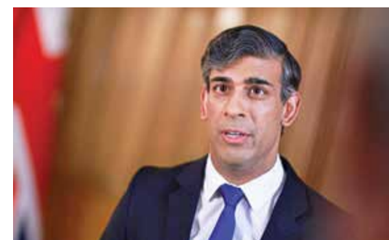
LONDON: Britain's Prime Minister Rishi Sunak records a statement inside 10 Downing Street in central London on April 14, 2024.

An Ipsos poll published in March found that 58 percent of voters view the Conservatives unfavorably, the highest percentage this parliament. Only 19 percent view them favorably. The survey gave Sunak a net favorability rating of minus 38, the lowest of any politician included.