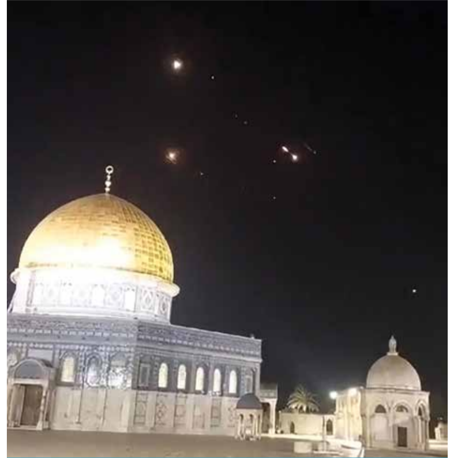
An image-grab from a video shows rocket trails in the sky above the Al-Aqsa Mosque compound in Jerusalem. Iran launched its first-ever direct attack on Zionist territory late on April 13, marking a major escalation of the long-running covert war between the regional foes and sparking fears of a broader conflict breaking out. — AFP

Al-Budaiwi called on all parties to exercise the utmost restraint to prevent any further escalation that threatens the stability of the region and the safety of its people, stressing the need for all parties to make joint efforts and take the approach of diplomacy as an effective way to settle disputes and ensure the security and stability of the region. — KUNA