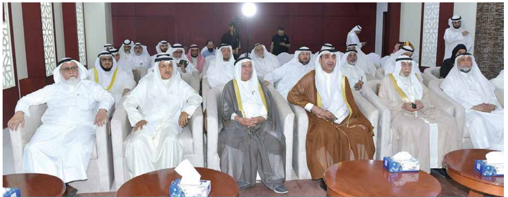
KUWAIT: Government officials and guests attend the 46th Islamic Book Fair.