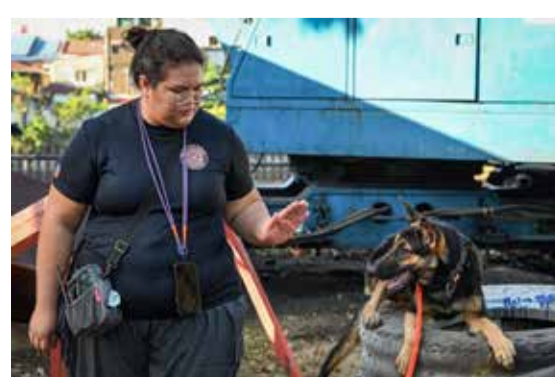
A handler commanding her dog during a search and rescue program.