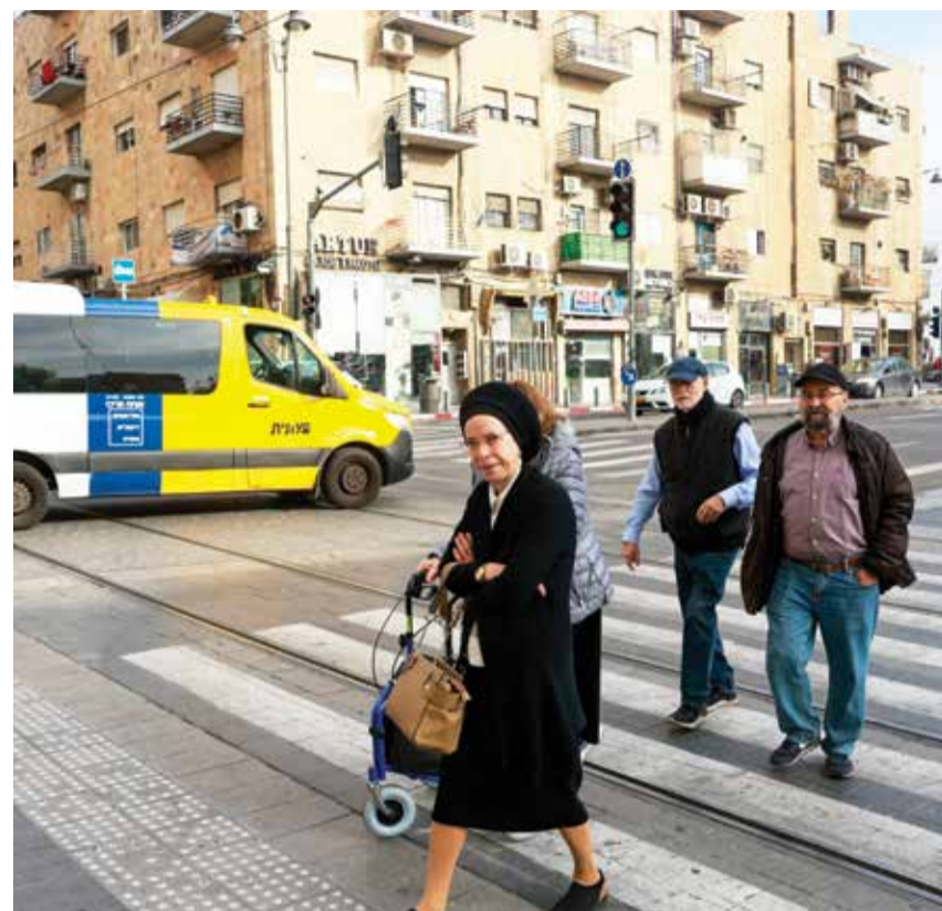
JERUSALEM: People cross a street in Jerusalem on April 14, 2024.