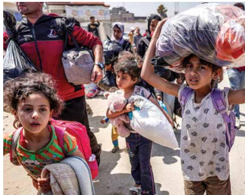
GAZA: Displaced Palestinians take the coastal Rashid road to return to Gaza City as they pass through Nuseirat in the central Gaza Strip on April 14, 2024.