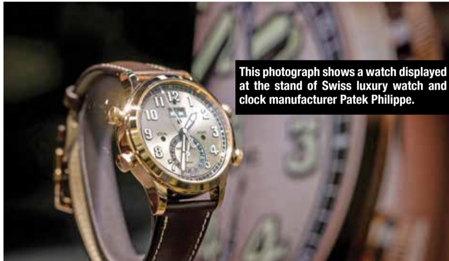
This photograph shows a watch displayed at the stand of Swiss luxury watch and clock manufacturer Patek Philippe.

She said revenge buying has peaked and inflation, rising interest rates