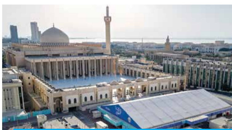
Zain's iftar hall at the Grand Mosque welcomed fasting individuals daily.