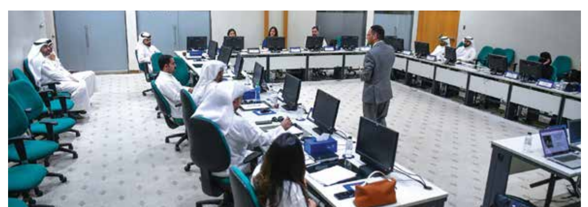
Participants are pictured during the training program.