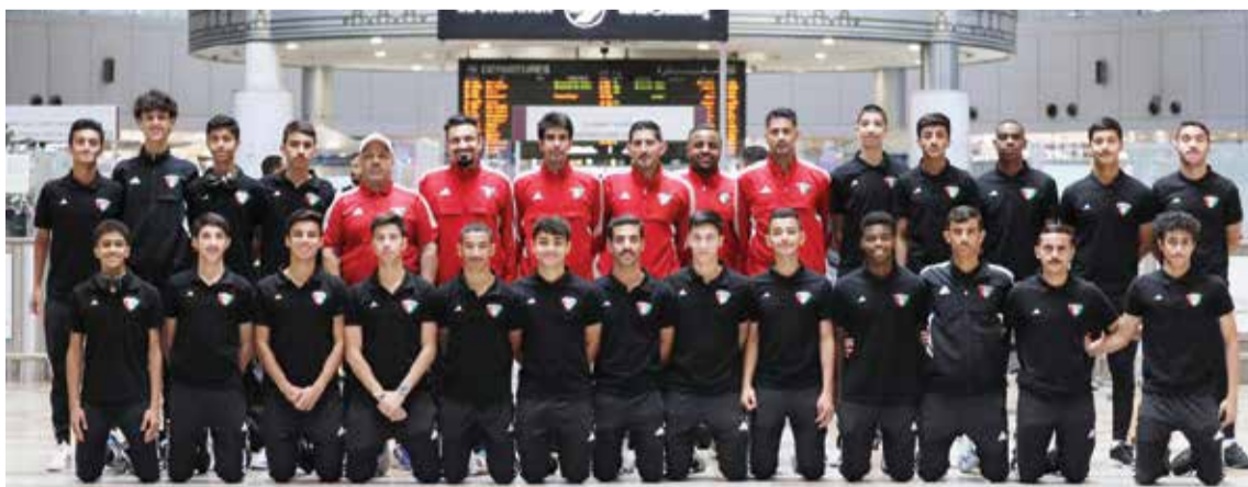
Kuwait Juniors Football team