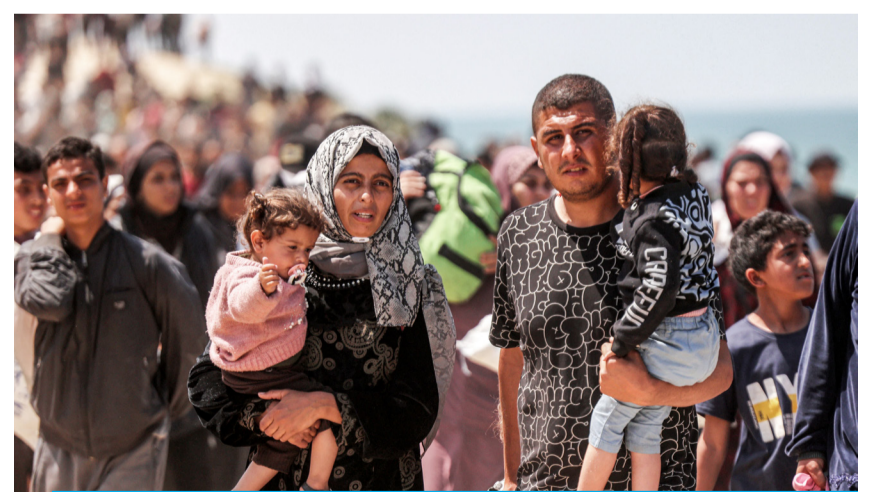
GAZA: Displaced Palestinians take the coastal Rasheed Road to return to Gaza City as they pass through Nuseirat in the central Gaza Strip on April 14, 2024.