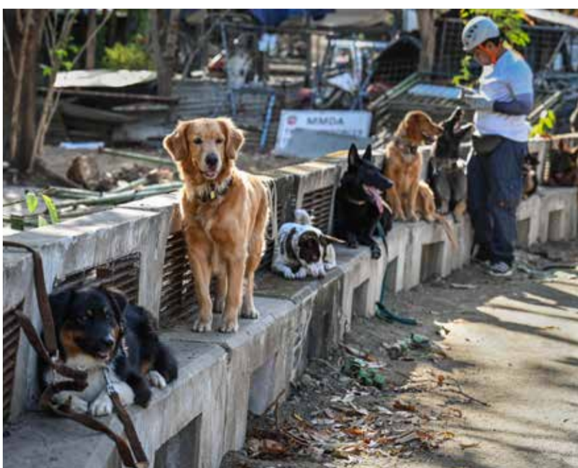
This photo shows dogs taking part in a search and rescue program in Taguig, metro Manila.