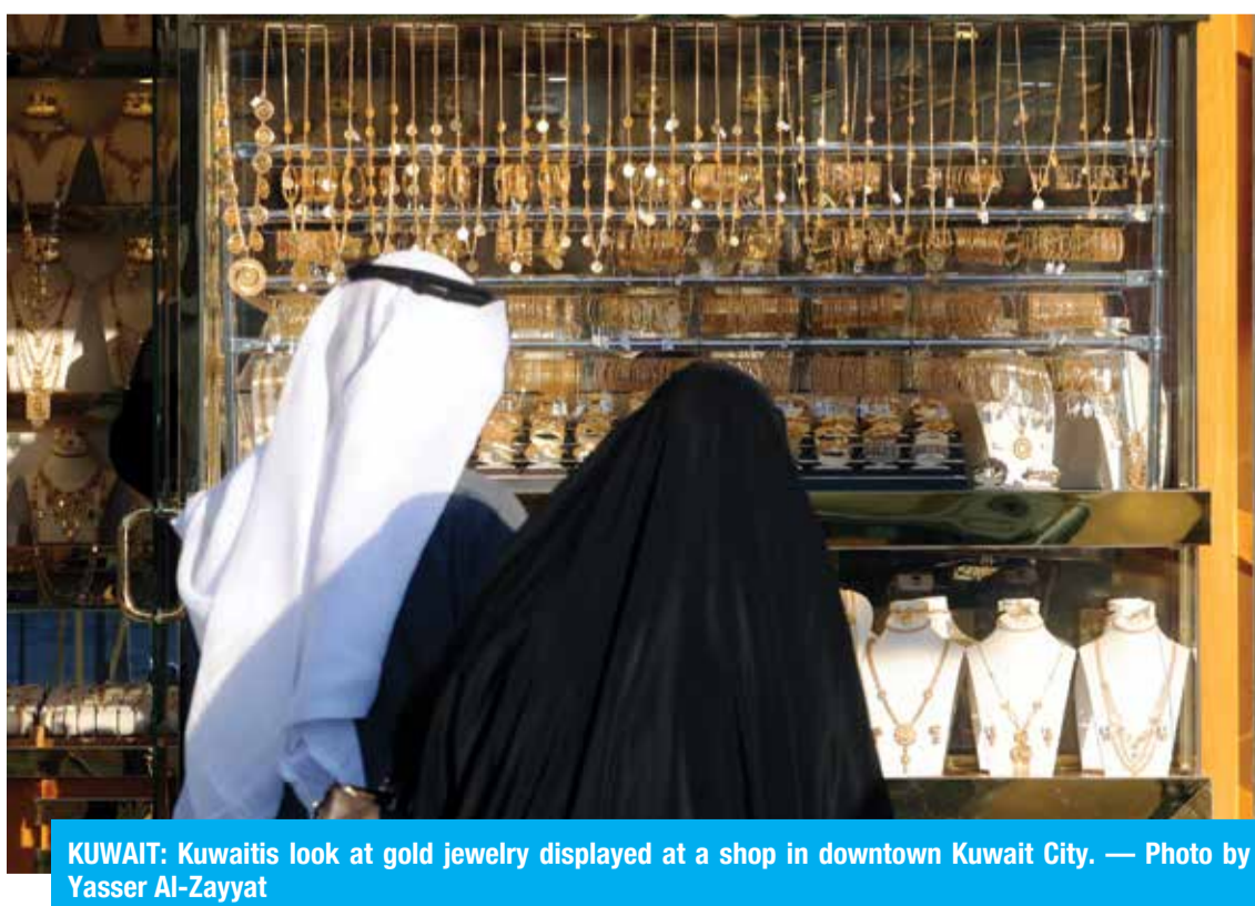
KUWAIT: Kuwaitis look at gold jewelry displayed at a shop in downtown Kuwait City.

It stressed that the factors that pushed gold to its highest level last Friday "are still strongly present," as the latest data indicates that central banks continue to buy the yellow metal, especially the People's Bank of China (Central Bank), which was the largest buyer of gold during the month of