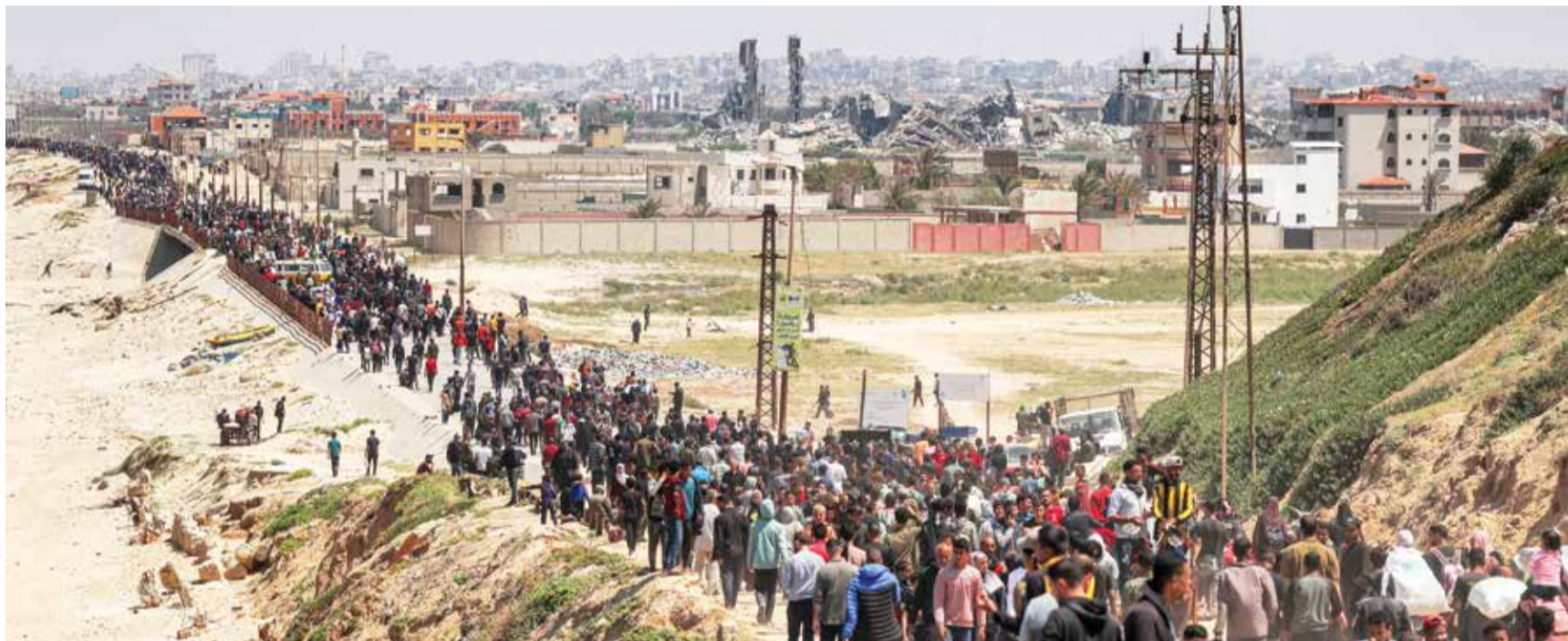
GAZA: Displaced Palestinians take the coastal Rashid road to return to Gaza City as they pass through Nuseirat in the central Gaza Strip on April 14, 2024.

Mossad said the Zionist entity would "continue to work to achieve the objectives of the war against Hamas with all its might, and will turn every stone to bring back the hostages from Gaza". De-