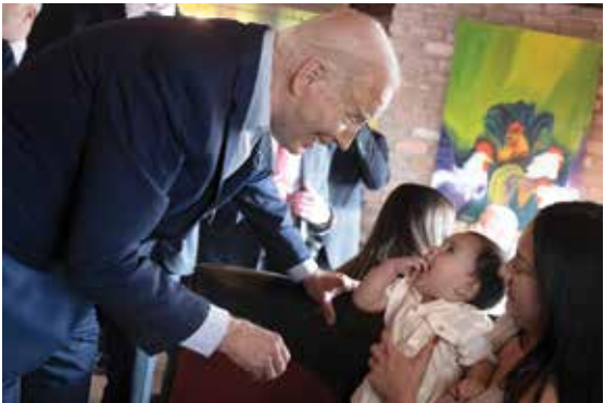
US President Joe Biden speaks to supporters during a campaign event at El Portal Restaurant in Phoenix, Arizona.

The speeches themselves aren’t exactly presidential—it’s hard to imagine Abraham Lincoln lashing out at judges or smearing political opponents as “Marxist thugs”—but Trump’s loyal base enjoys his proclivity for incendiary rhetoric and personal grievance. They are likely to see more of it, with jury selection beginning April 15 in Trump’s trial for campaign finance violations in New York.