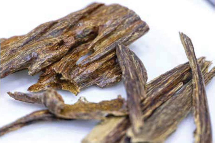
A type of Bukhoor called Ambala, considered one of the best types, brought from India, WHICH sells for around KD 35 per tola.

Ahmad described to Kuwait Times the meticulous process of producing oud oil. "Take, for exam-