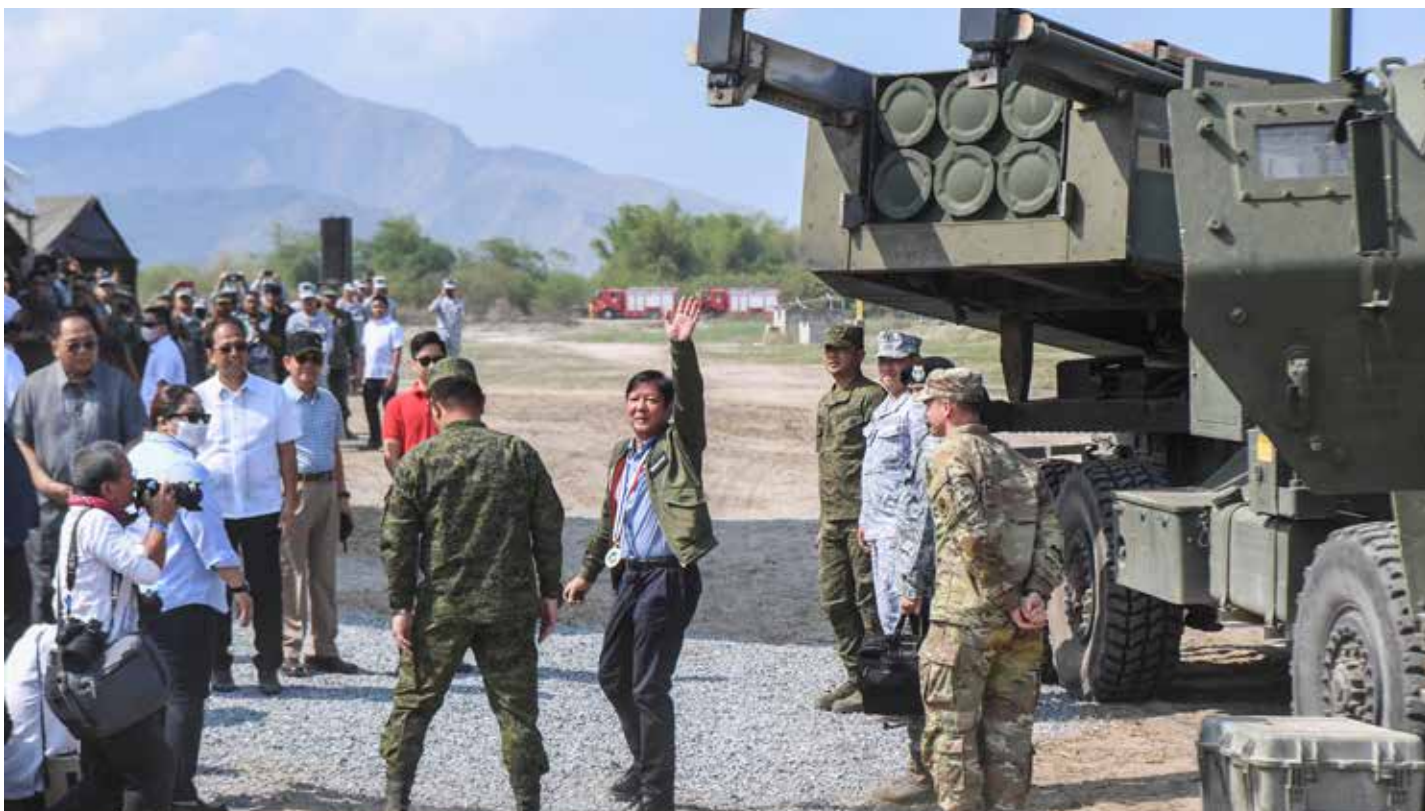
SAN ANTONIO, Philippines: Philippine President Ferdinand Marcos (center) waves to photographers after inspecting a high mobility artillery rocket system (HIMARS) before a live fire exercise as part of the US-Philippines Balikatan joint exercise at the naval training base in San Antonio in this file photo.

Marcos said the international community had "offered to help us on what the Philippines requires to protect and