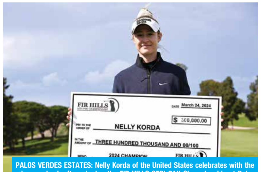
PALOS VERDES ESTATES: Nelly Korda of the United States celebrates with the winners check after winning the FIR HILLS SERI PAK Championship at Palos Verdes Golf Club.

Van Aert will almost certainly be a gold medal contender for both the individual time trial and the 273km road race around Paris at the 2024 Olympics. Wednesday's race was won by Van Aert's American teammate Matteo Jorgenson who added Around Flanders to his Paris-Nice victory earlier in March.