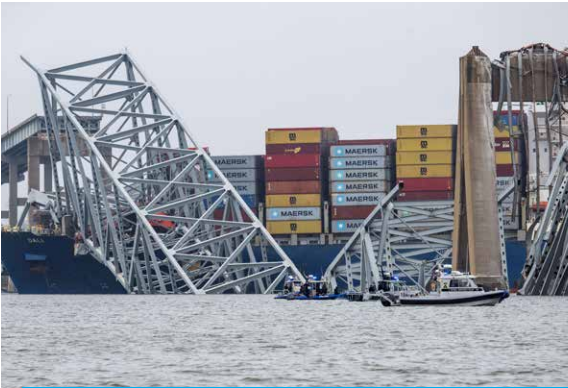
BALTIMORE, USA: The collapsed Francis Scott Key Bridge lies on top of the container ship Dali in Baltimore, Maryland, on March 27, 2024.