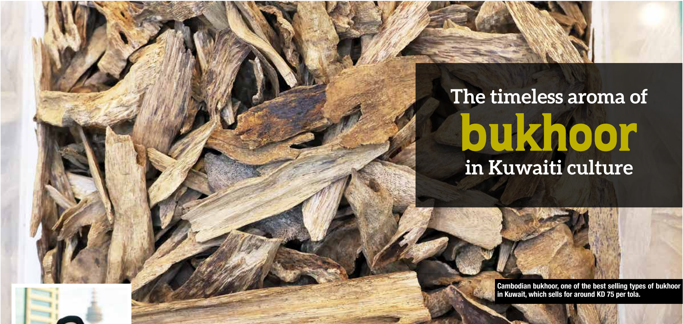
Cambodian bukhoor, one of the best selling types of bukhoor in Kuwait, which sells for around KD 75 per tola.