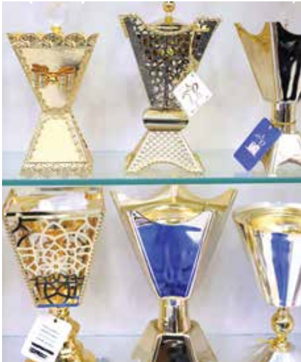
Beautiful mukhars are used for decorative purposes besides burning bukhoor.