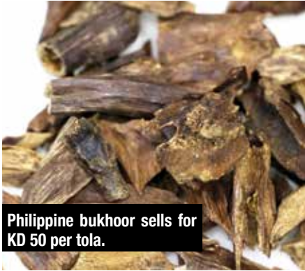
Philippine bukhoor sells for KD 50 per tola.