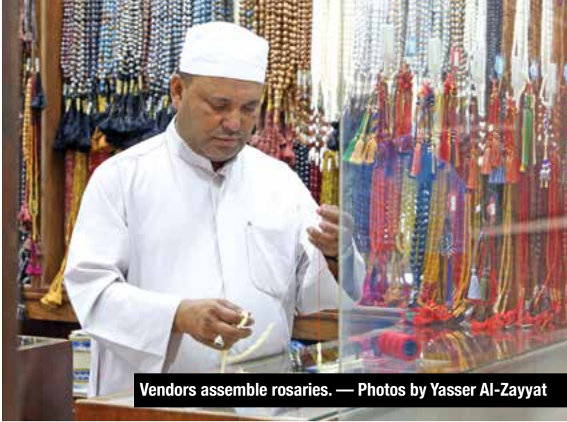
Vendors assemble rosaries.