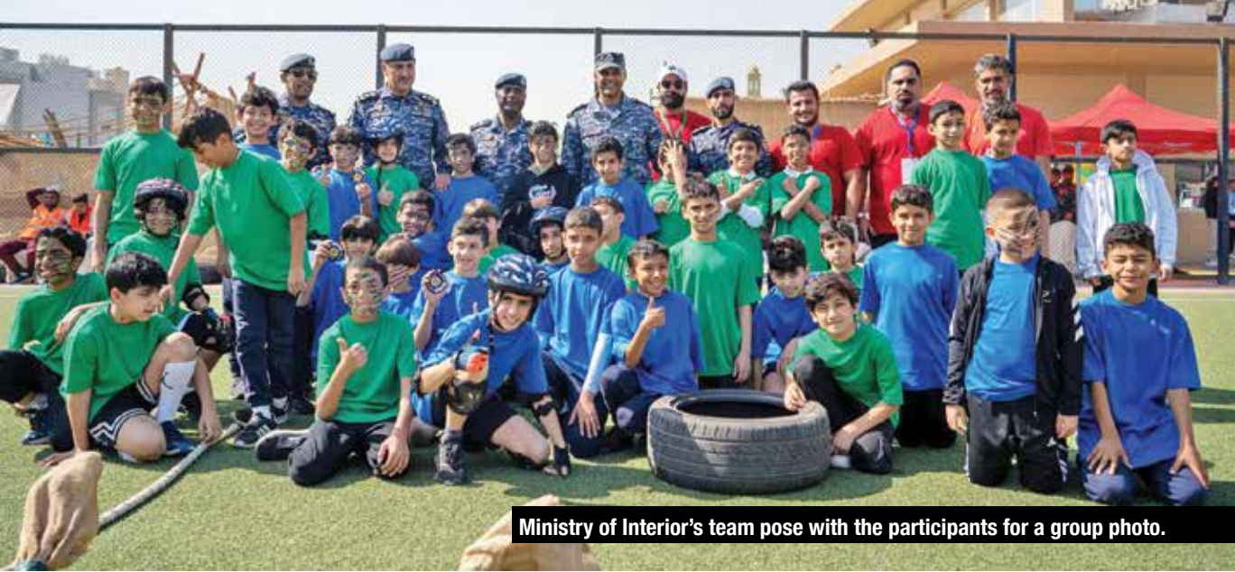
Ministry of Interior's team pose with the participants for a group photo.

level and also include girls' schools and not just boys," Murad added. He highlighted that this innovative initiative not only underscores the importance of physical activity in youth development, but also demonstrates the power of partnership and collaboration in bringing innovative ideas to fruition.