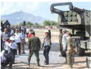
Marcos: Philippines will not be ‘cowed into silence’ by China