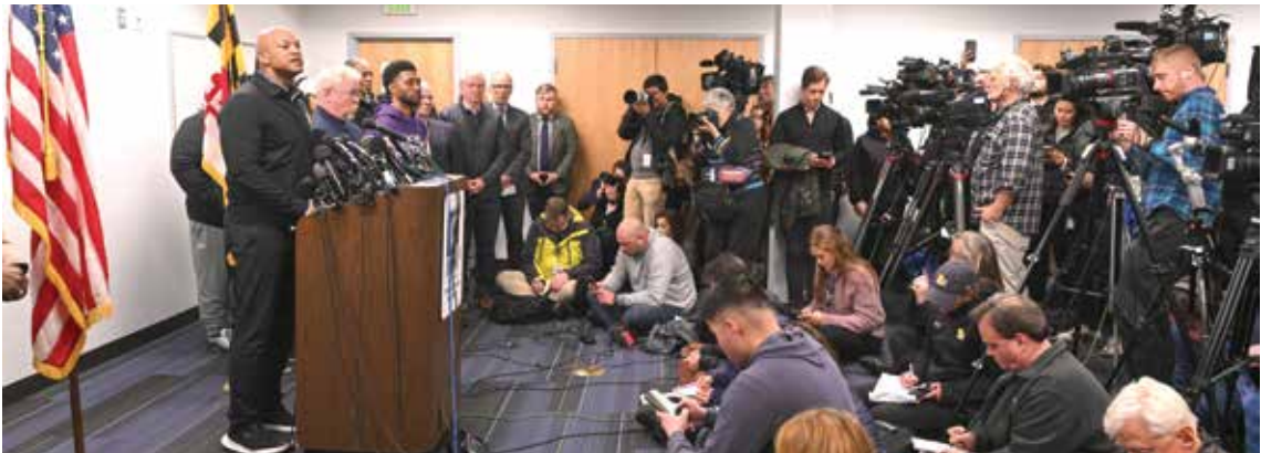
BALTIMORE, US: Maryland Governor Wes Moore speaks during a press conference in Baltimore, Maryland, on March 27, 2024.