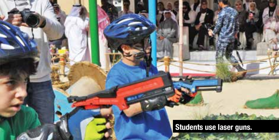
Students use laser guns.