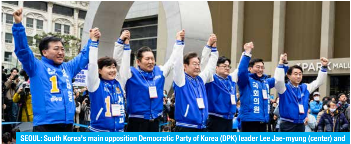
SEOUL: South Korea's main opposition Democratic Party of Korea (DPK) leader Lee Jae-myung (center) and other party members join hands at a campaign event for the upcoming parliamentary elections in Seoul on March 28, 2024.

"This is not negative campaigning. This is addressing the needs of the people," he told cheering supporters. But with Yoon's approval rating hovering around 34 percent, and public discontent running high over the country's lackluster economy, the opposition DP and the newly formed minor third party are ahead in some polls. Lee urged people to treat the vote as a referendum on the last two years under Yoon. "Due to the government's incompetence, living cost has skyrocketed, and peace on the Korean Peninsula is in danger due to the foolishness of (Yoon) only shouting for war," Lee said, slamming the president's hawkish approach to the nuclear-armed North.