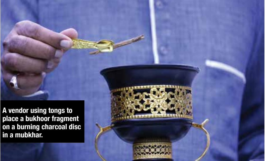
A vendor using tongs to place a bukhoor fragment on a burning charcoal disc in a mukhar.