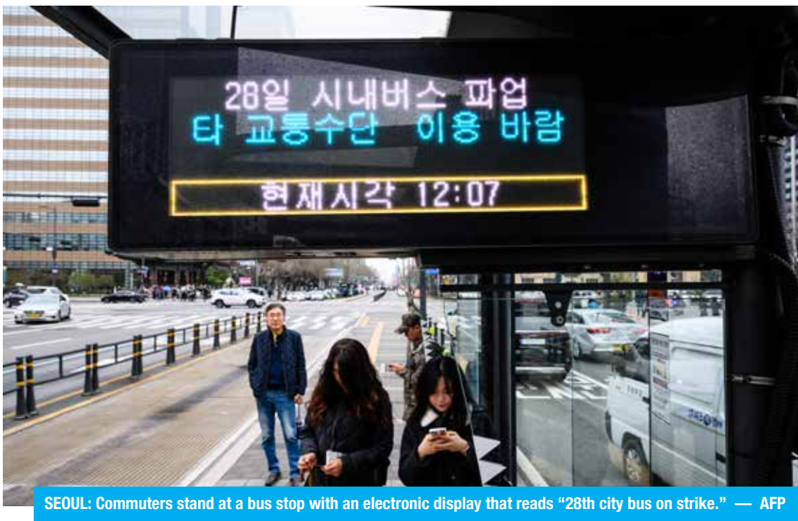
SEOUL: Commuters stand at a bus stop with an electronic display that reads "28th city bus on strike." — AFP

last year in England, official statistics showed on Wednesday, angering campaigners wanting cleaner rivers and seas. Environmentalists have increasingly voiced outrage at the rise in pollution on the UK's beaches and waterways, and have pointed the finger at privatized water companies. — AFP