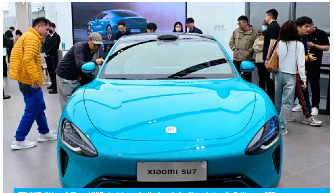
BEIJING, China: A Xiaomi SU7 electric car is displayed at a Xiaomi store in Beijing.