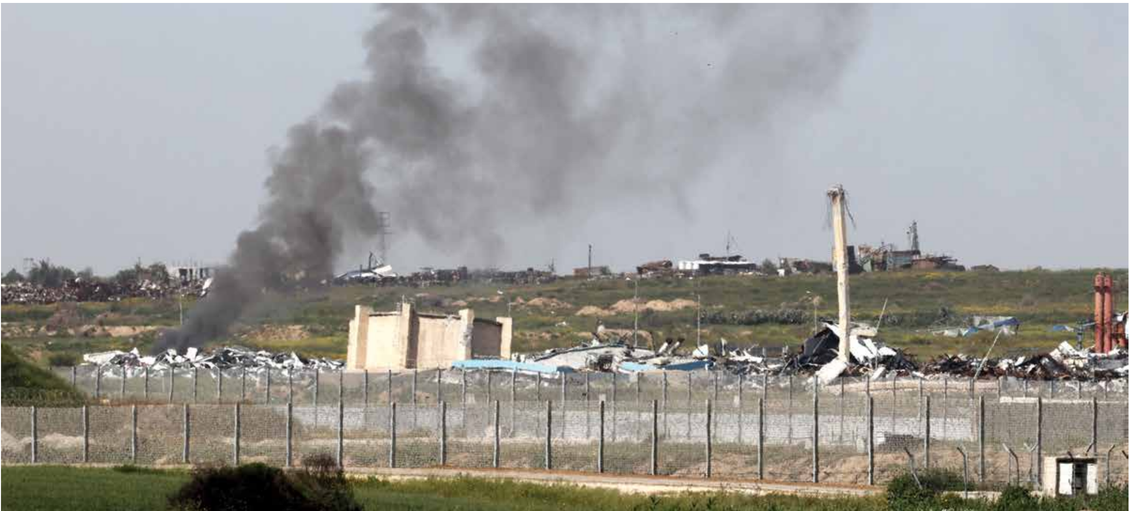
This picture taken on March 28, 2024 from Zionist entity’s southern border with the Gaza Strip shows smoke billowing on the Palestinian side amid the ongoing battles.