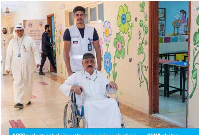
KRCS' volunteer helping voters in previous elections.