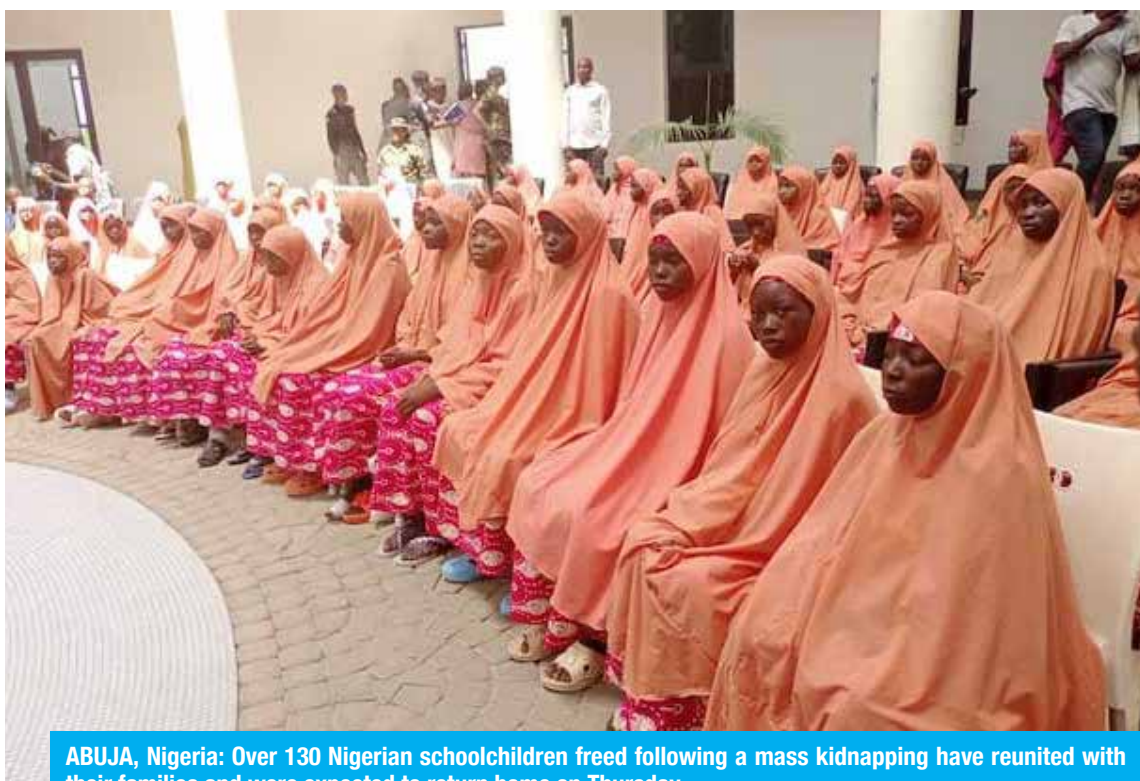
ABUJA, Nigeria: Over 130 Nigerian schoolchildren freed following a mass kidnapping have reunited with their families and were expected to return home on Thursday.

Discrepancies between the number of people kidnapped and released are common in Nigeria due to unclear early reports and the return of those who go missing while fleeing attacks. But it was still not