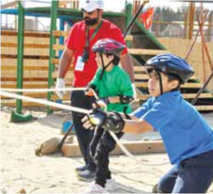
Students take part in the tug-of-war.