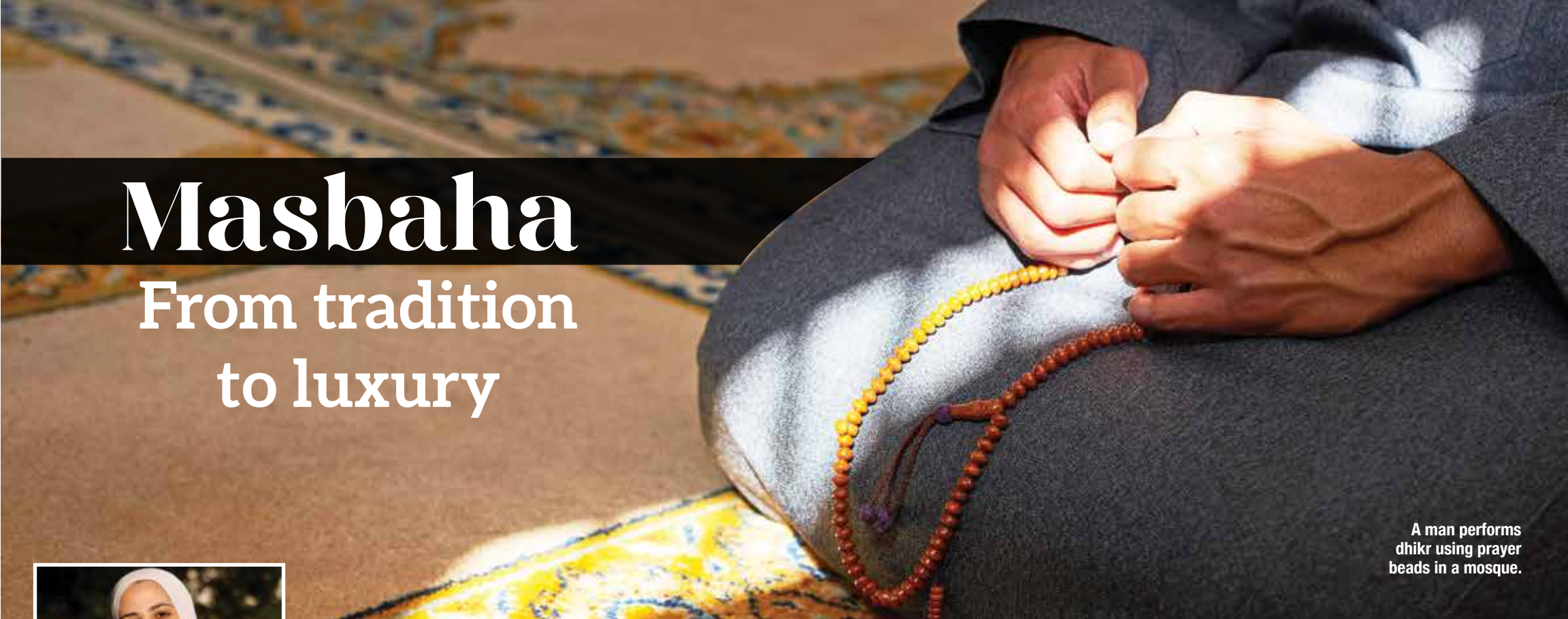
A man performs dhikr using prayer beads in a mosque.