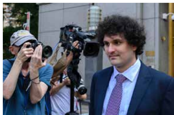
Sam Bankman-Fried is likely to be sentenced following his conviction in one of the biggest financial fraud cases in history.

searcher, told AFP she had switched to work from home after learning of the strike, but said she supported it. "I am willing to take some inconvenience that could incur from the labor-management negotiations," she said. — AFP