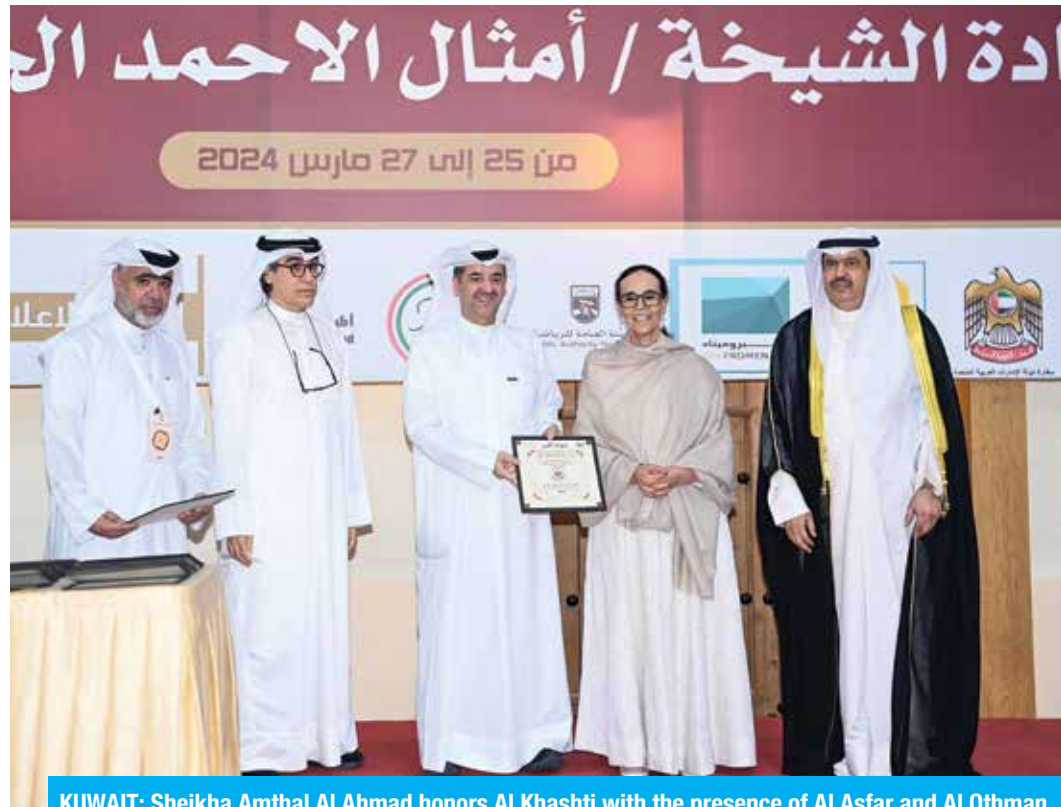
KUWAIT: Sheikha Amthal Al Ahmad honors Al Khashti with the presence of Al Asfar and Al Othman.

Competition embodied Kuwait's rich cultural heritage and embraced local talents