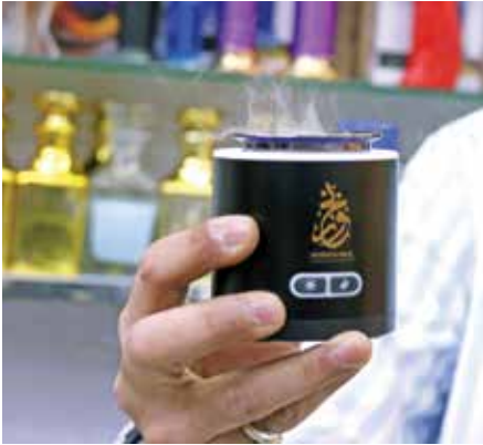
Electronic mukhar is used to burn bukhoor or maamoul without the need for charcoal discs.