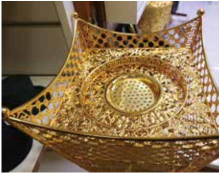
The recessed center of the mukhar, where the charcoal disc and bukhoor are placed.