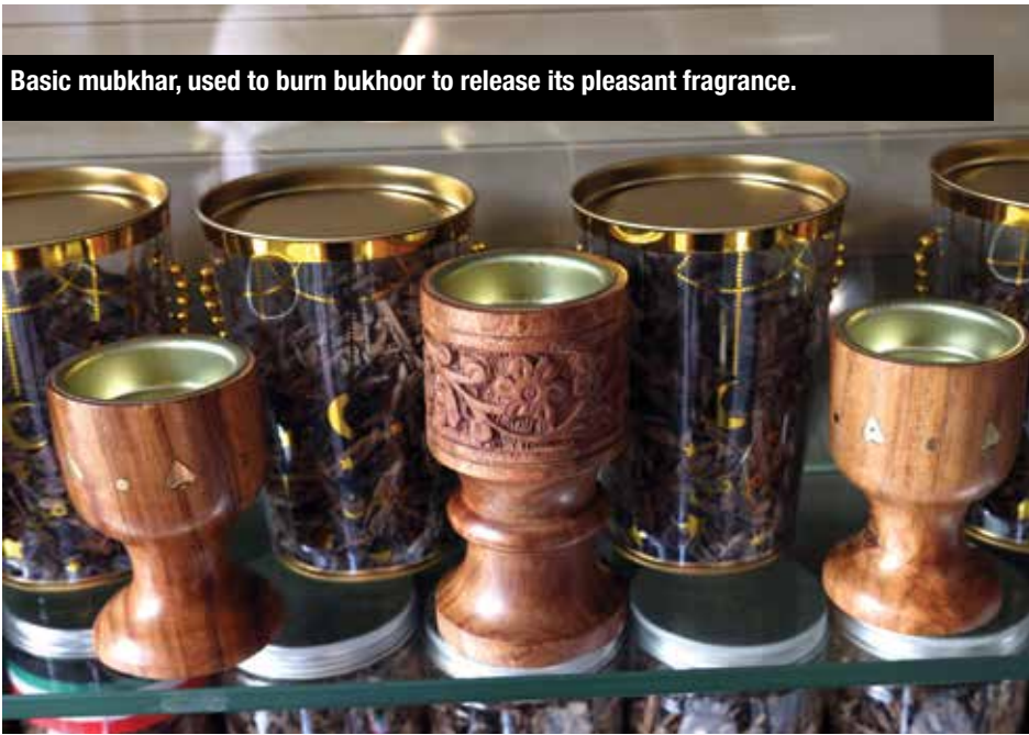
Basic mukhar, used to burn bukhoor to release its pleasant fragrance.

B ukhoor is a cherished tradition deeply intertwined with Kuwait's culture and heritage. It has been used by Kuwaitis since ancient times and continues to hold its place in their lives to this day. Kuwaitis use different types of bukhoor for various purposes, whether for daily use, celebratory events, perfuming their clothes and more. This practice adds a luxurious touch to living spaces and creates a welcoming atmosphere for guests.