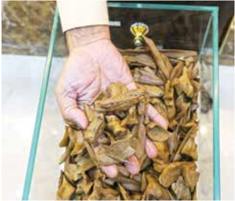
Mahfouz Ahmad showing Kuwait Times some unique looking bukhoor.

Bukhoor comes in different types, shapes and scents, and the choice of which kind to use is based on personal preference. According to Mahfouz Ahmad, a vendor at a well-known bukhoor shop in Kuwait, Kuwaitis often prefer a type of bukhoor known as "Tarath A" for scenting clothes, rooms and even brides.