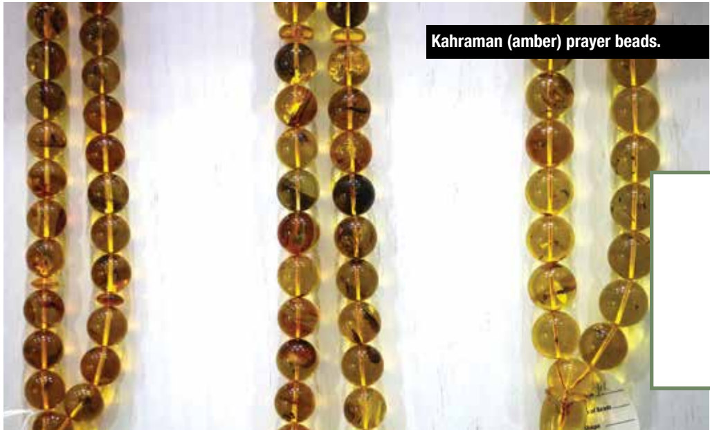
Kahraman (amber) prayer beads.

The art of crafting prayer beads originally emerged from Iraq, Persia, and among pilgrims from Makkah, eventually making its way to Kuwait in the mid-20th century, as noted by heritage researcher