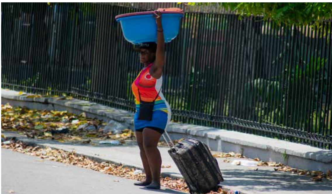
PORT-AU-PRINCE, Haiti: A woman leaves an area that was set fire to by armed gangs in Port-au-Prince, Haiti, on March 25, 2024.

Kenya, which agreed to lead a long-awaited, UN-approved mission to Haiti to back its security forces as they grapple with the well-armed gangs, has put its plans on hold until the transitional council is in place. Once the mission is established, Turk