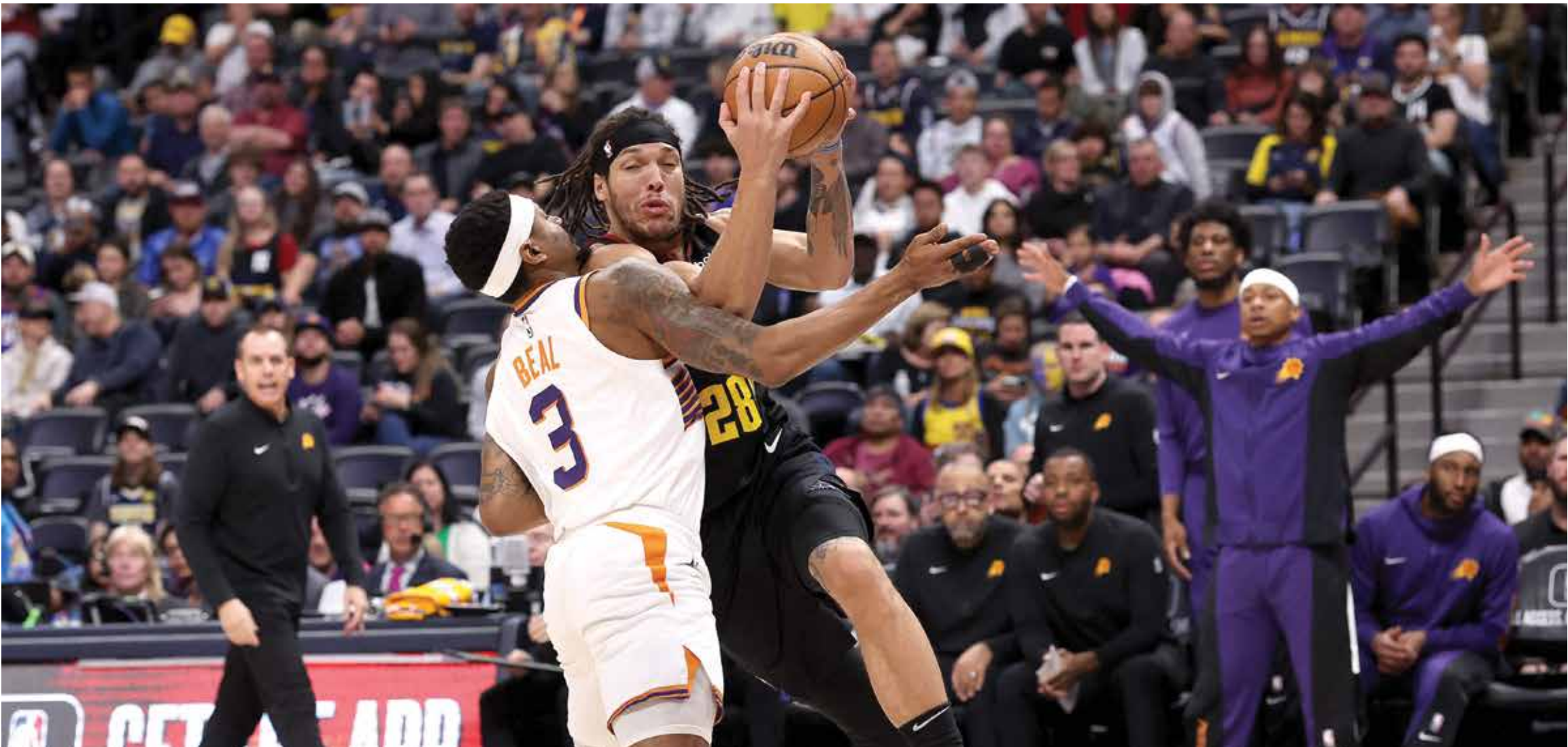
DENVER: Aaron Gordon #50 of the Denver Nuggets drives against Bradley Beal #3 of the Phoenix Suns during the first quarter at Ball Arena on March 27, 2024 in Denver, Colorado.

Timberwolves beat Detroit Pistons 106-91