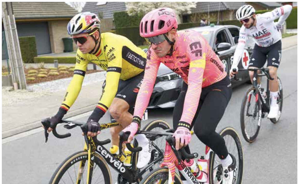
WAREGEM: Belgian Wout van Aert of Team Visma-Lease a Bike (L) and Italian Alberto Bettiol of EF Education-EasyPost compete in the Around Flanders cycling classic, 188.6 km from Roeselare to Waregem on March 27, 2024.

Not just kind of set my end goal as the Hall of Fame. I think sometimes that