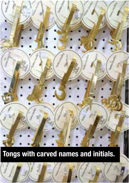
Tongs with carved names and initials.