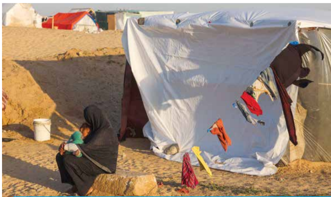
RAFAH: A displaced Palestinian woman cuddling her baby sits on a stone in front of her tent at a camp in Rafah on March 11, 2024.