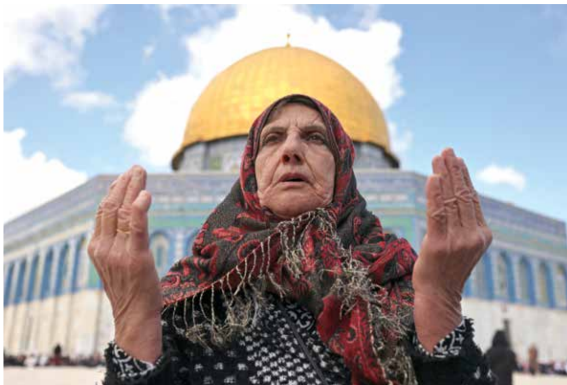
JERUSALEM: A woman raises her hands in prayer on the first Friday of the holy month of Ramadan in front of the Dome of the Rock at the compound of the Al-Aqsa mosque on March 15, 2024.