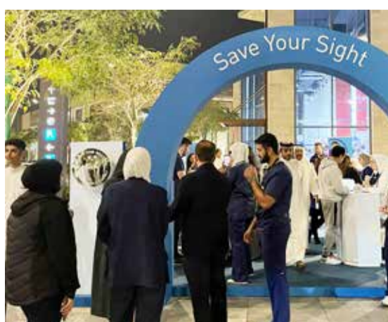
'Save your sight' - an eye protection initiative launched by a group of Kuwaiti medical students at the Arabian Gulf University.