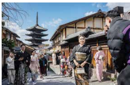
A woman in Kimono poses for photographs on a street in Kyoto.

The 220-year-old RHS and the Wildlife Trusts, founded in 1912 and now an umbrella organization for 46 local groups,