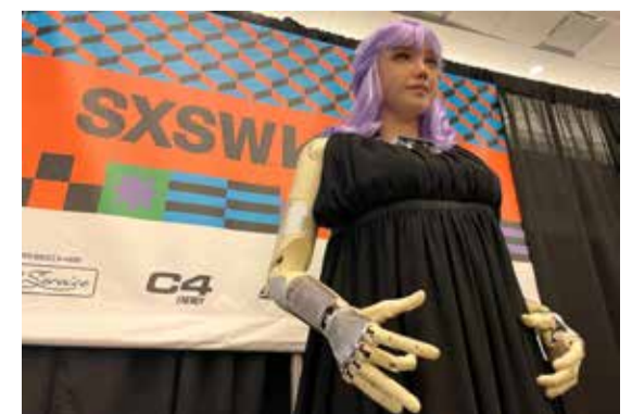
AUSTIN: Desdemona, a humanoid robot designed by Hanson Robotics and endowed with expressiveness and interactivity to teach AI to understand and care about people, is displayed at a SXSW conference titled "How to make AGI beneficial and avoid a robot apocalypse" in Austin, Texas.