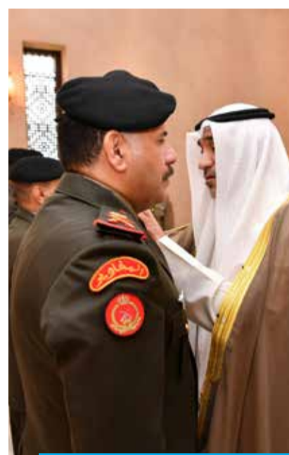
KUWAIT: Deputy Prime Minister, Minister of Defense, and Acting Minister of Interior Sheikh Fahad Yousef Saud Al-Sabah conferred the rank of Major General upon several army officers.

In 2022, Kuwait formed a high committee for