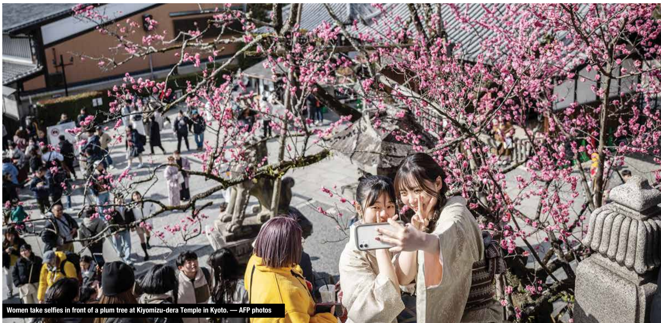
Women take selfies in front of a plum tree at Kiyomizu-dera Temple in Kyoto.