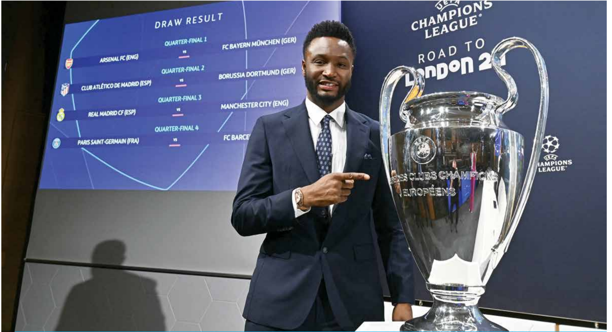
NYON: Former Nigerian footballer John Obi Mikel poses next to the trophy after performing the 2023-2024 UEFA Champions League football tournament quarter-finals and semi-finals draw at the House of European Football in Nyon.