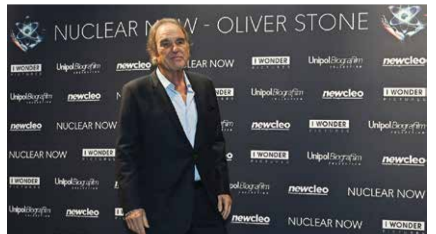
US director Oliver Stone attends the red carpet event for his movie ‘Nuclear Now’ in Rome.

“And so that's what they did with Lula. They put him in jail and he got out and he won the election. It was a hell of a story... but people don't know it, except in Brazil.” Stone has often focused on Latin American leftist leaders, with no less than three documentaries about the late Cuban leader Fidel Castro, and one about his friend the Venezuelan leader Hugo Chavez, who died in 2013. Lula, Castro and Chavez were all “humanists”, he said.