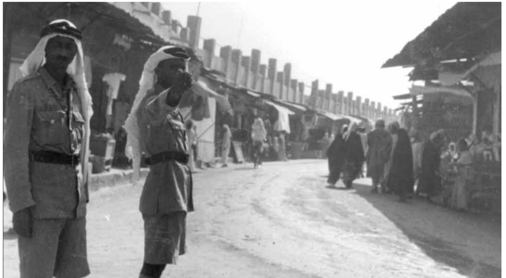
KUWAIT: Photo shows policemen in their traditional uniform on a street in Kuwait in the 1960s.