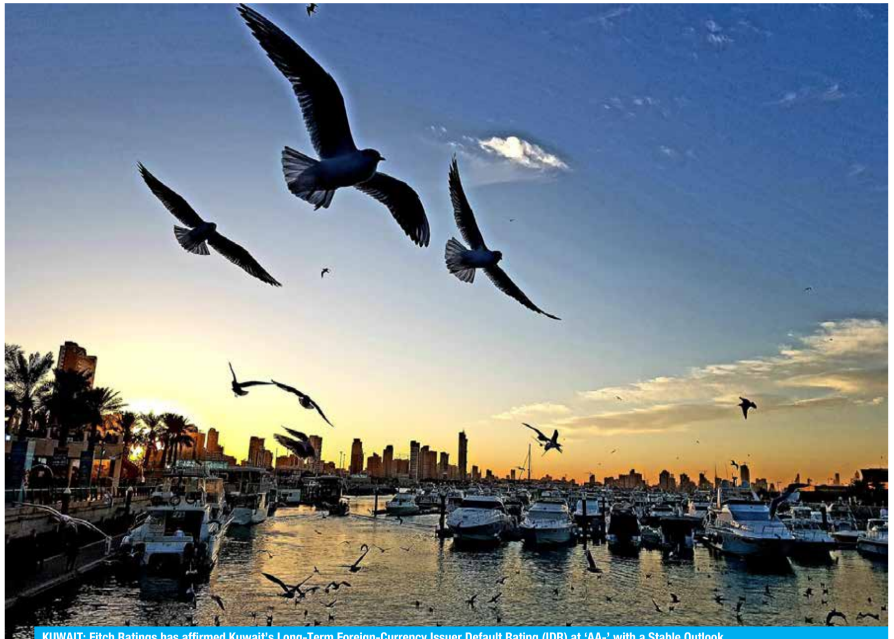
KUWAIT: Fitch Ratings has affirmed Kuwait's Long-Term Foreign-Currency Issuer Default Rating (IDR) at 'AA-' with a Stable Outlook.

Under the government's reporting convention, which does not include KIA's investment interest in-