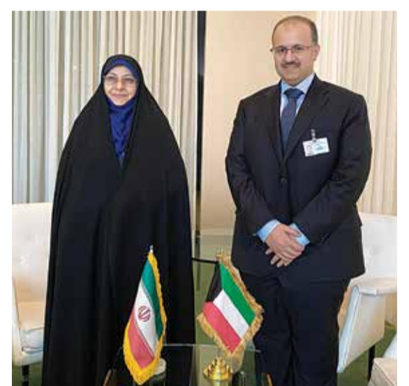
Minister of Social Affairs, Family, and Childhood Affairs Sheikh Feras Al-Malik Al-Sabah with Iran's Vice-President for Women and Family Affairs Ensiyeh Khazali.