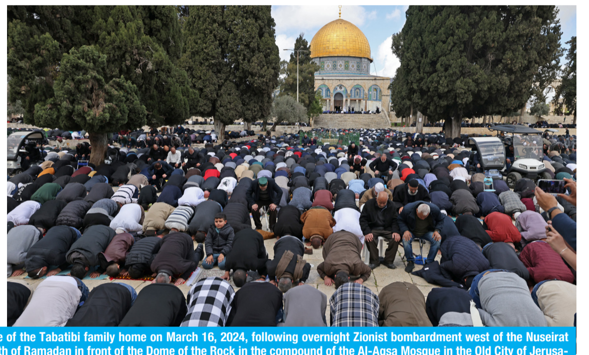
(Left) Palestinians mourn at the Al-Aqsa Martyrs Hospital in Deir al-Balah victims pulled from the rubble of the Tabatibi family home on March 16, 2024, following overnight Zionist bombardment west of the Nuseirat refugee camp in the central Gaza Strip. (Right) Devotees offer first Friday prayers of the holy fasting month of Ramadan in front of the Dome of the Rock in the compound of the Al-Aqsa Mosque in the Old City of Jerusalem on March 15, 2024.