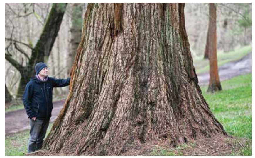
Senior Research Leader and spatial analysis at Kew Royal Botanic Garden Justin Moat stands by a giant redwood tree.

rainfall patterns, the researchers compiled a map, pinpointing the locations of nearly 5,000 individual trees across the country. They analyzed 97 individual trees at Benmore Botanic Gardens in central Scotland, at Kew Garden's Wakehurst Place in the south of England and at a mixed woodland in Havering Country Park east of London.