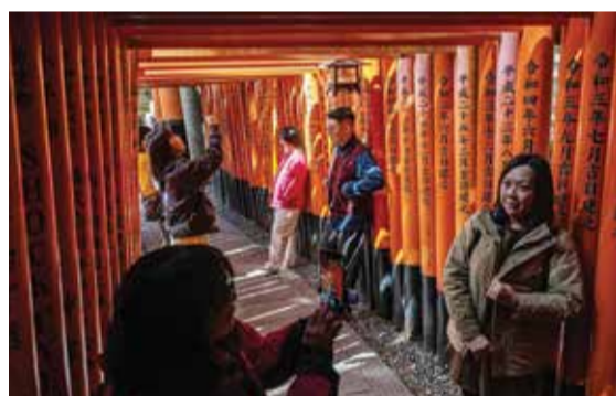
People take pictures at the Torii path of Fushimi Inari-taisha shrine in Kyoto.