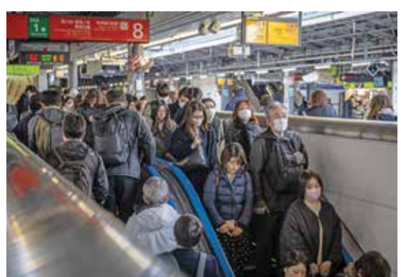
People pass through Shinjuku station in Tokyo on March 15, 2024.

Even so, the bank has stressed that it needs to see a "virtuous cycle" of rising wages and sustained, demand-driven inflation of two percent before changing its ways. The bank will announce its policy decision on Tuesday. "Rengo's first tally of responses... should greatly encourage the Bank of Japan to revise its poli-