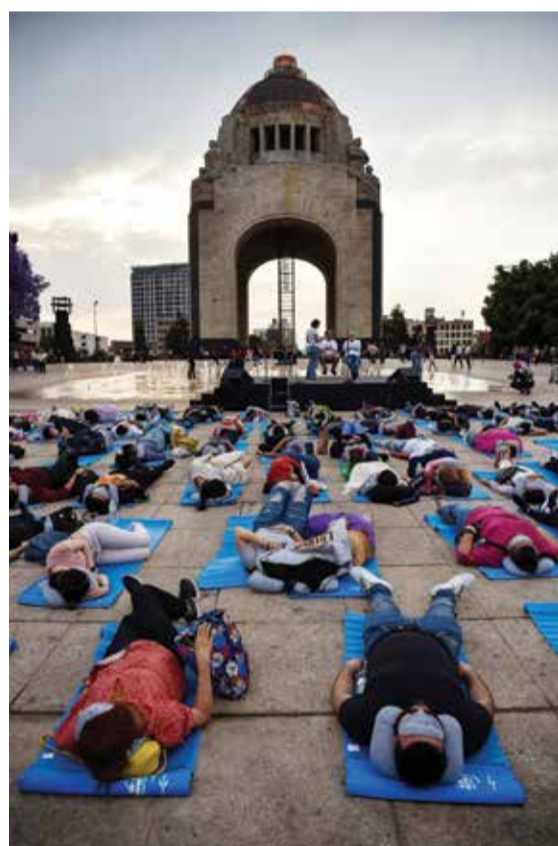
People enjoy a nap while attending the World Sleep Day event at the Monumento a la Revolucion in Mexico City, Mexico.

In one of Mexico City's busiest neighborhoods on Friday, about 200 people took a collective nap in the middle of the street to celebrate World Sleep Day.