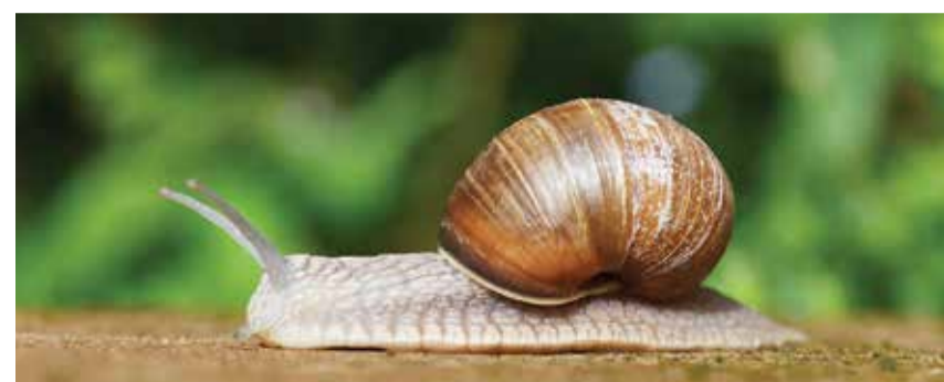
A picture shows an edible snail in a garden near the village of Zella-Mehlis, Germany. — AFP

"Untitled" by Romanian-born Andra Ursuta is a hollow, life-size person on a horse covered in a shroud and cast in a lime-green resin, according to the Fourth Plinth commissioning group. — AFP