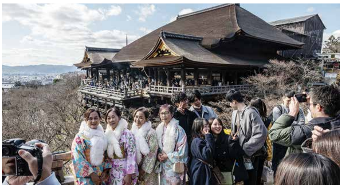
Women in Kimono pose for photographs at Kiyomizu-dera Temple in Kyoto.