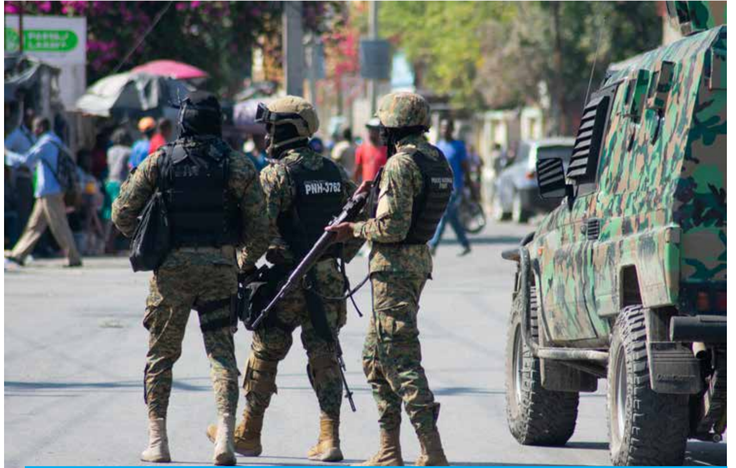
PORT-AU-PRINCE: Haitian police officers deploy in Port-au-Prince, Haiti, on March 9, 2024.

"And that is in part reflective of the demand and the desired capacity of the illicit end-users," he said, while cautioning that hard data — both on the number of guns and their countries of origin — remains hard to pin down because of the weapons' illegal nature.