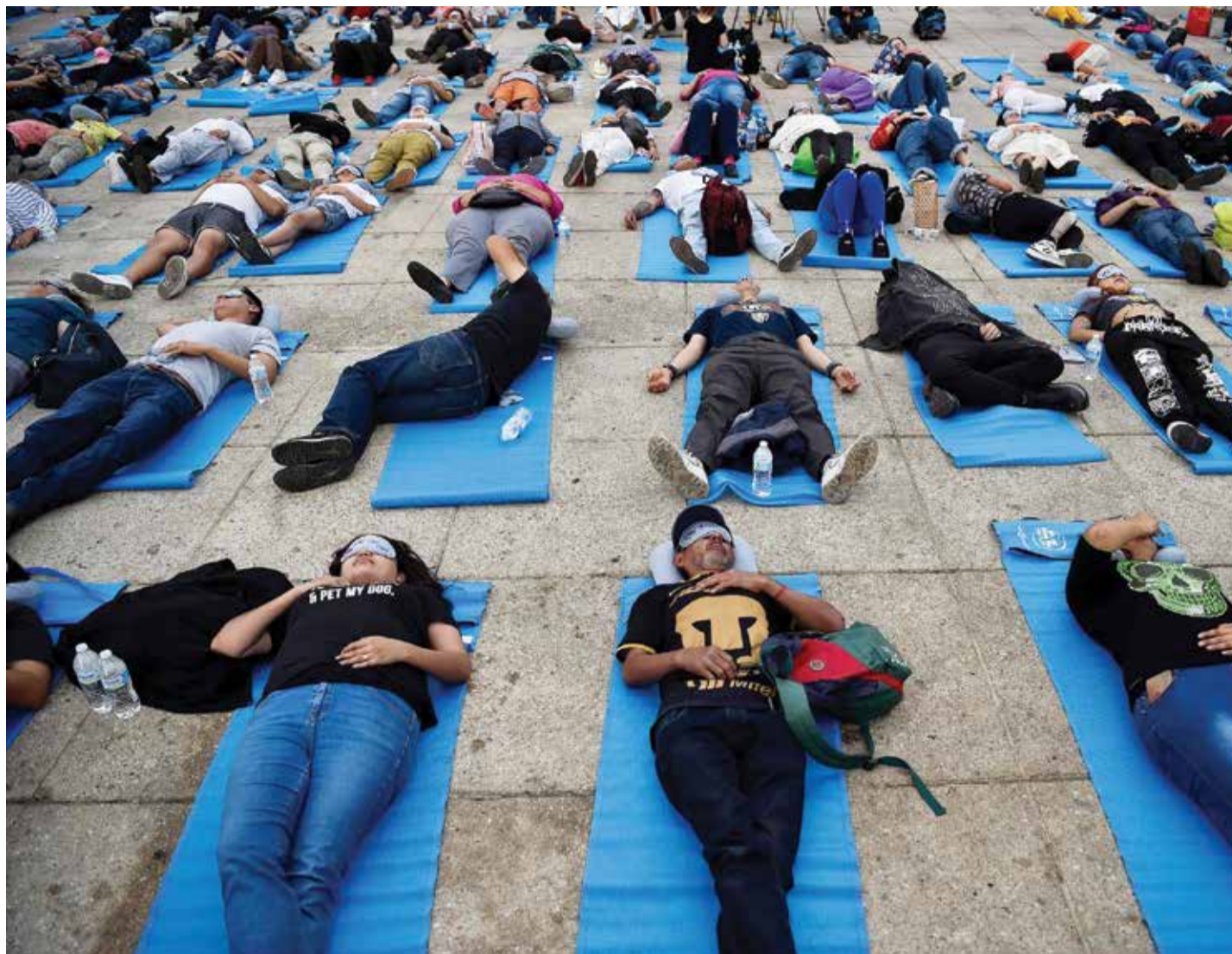
People enjoy a nap while attending the World Sleep Day event at the Monumento a la Revolucion in Mexico City, Mexico.