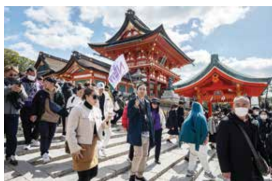
Tourists visit Fushimi Inari-taisha shrine in Kyoto.

Kyoto is cracking down after locals complained that Instagram-obsessed tourist "paparazzi" are harassing the Japanese city's famous, immaculately dressed geisha. Real-life geisha, or "geiko" ("women of art") as they are known locally, work for a living — as they have for centuries — in teahouses in Kyoto's picturesque Gion district where they perform traditional Japanese dance, music and games. However, like other major tourist attractions around the world such as Bruges in Belgium, Venice in Italy, or Rio de Janeiro's Sugarloaf Mountain, locals are fuming.