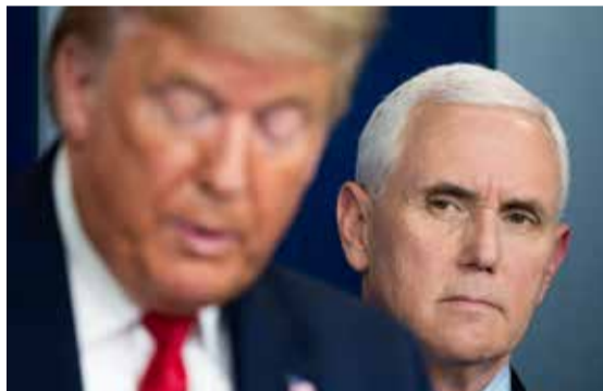
WASHINGTON: Former US Vice President Mike Pence listens as former US President Donald Trump speaks in this file photo.

Pence was one of Trump's early rivals in the primary