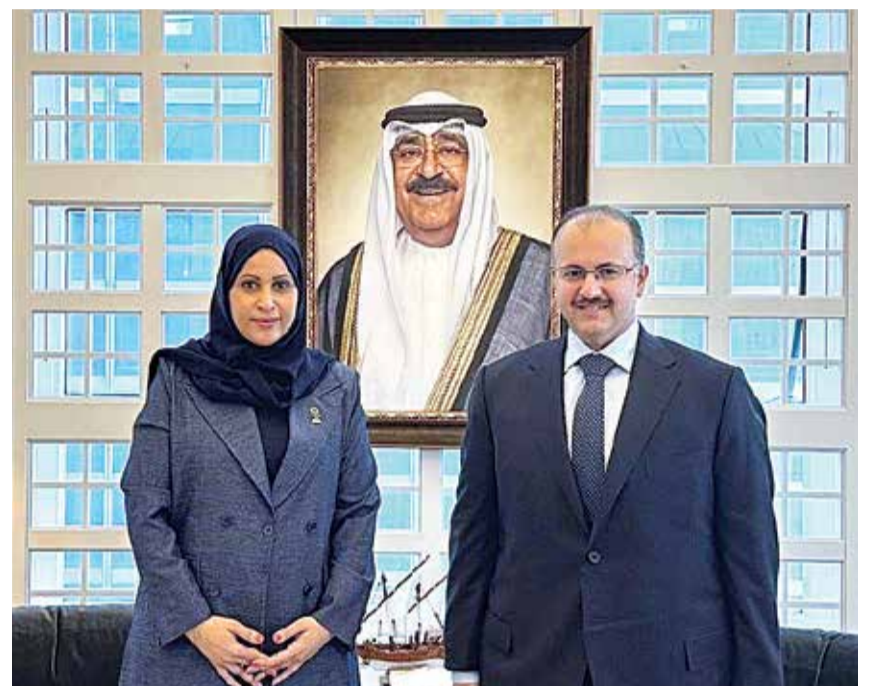
Kuwait Minister of Social Affairs with Secretary General of the Saudi Family Affairs Council Maimoonah Al-Khalil.

Kuwait Minister of Social Affairs also held talks with Secretary General of the Saudi Family Affairs Council Maimoonah Al-Khalil on ways to enhance bilateral cooperation to protect the family institution. This came during a meeting at the premises of Kuwait's Permanent Mission to the UN in New York. The officials engaged in discussions on mutual interests, particularly concerning women, such as achieving work and family balance for both genders and shoring up collaboration to improve the status of women in the Gulf region. — KUNA