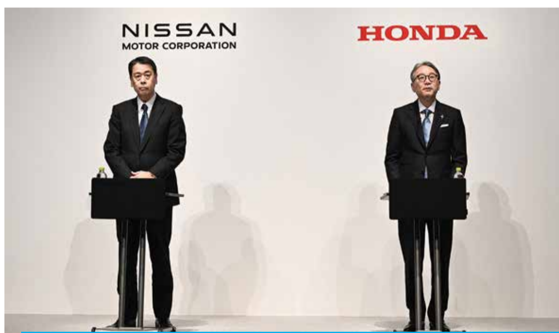
TOKYO: Makoto Uchida, president and CEO of Nissan (left) and Toshihiro Mibe, Honda director, president and representative executive officer attend a joint press conference in Tokyo on March 15, 2024.

Media reports said the partnership could include joint development of a common EV powertrain — a so-called e-axle — and joint procurement of batteries. Honda CEO Toshihiro Mibe said that there was a "once-in-a-century transformation in the automotive industry". "Our study criteria will be whether the synergy of the technologies and knowledge that our companies have cultivated will enable us to become industry leaders by creating new value for the automotive industry," he said. Hybrids that combine battery power and internal combustion engines have proved enduringly popular in Japan, accounting for 40 percent of sales in 2022. But Japanese firms' focus on hybrids has left them in the slow lane in meeting the