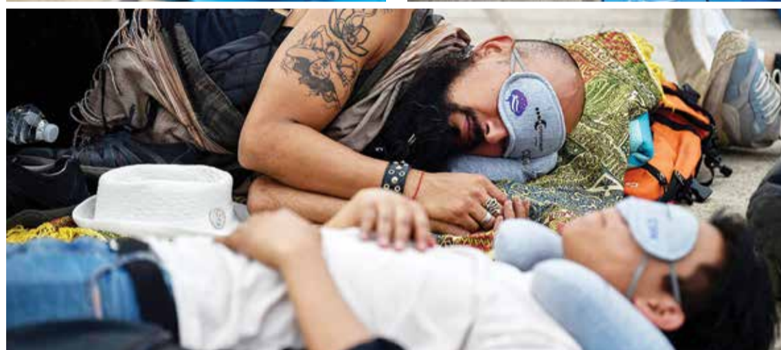
People enjoy a nap while attending the World Sleep Day event at the Monumento a la Revolucion in Mexico City, Mexico.