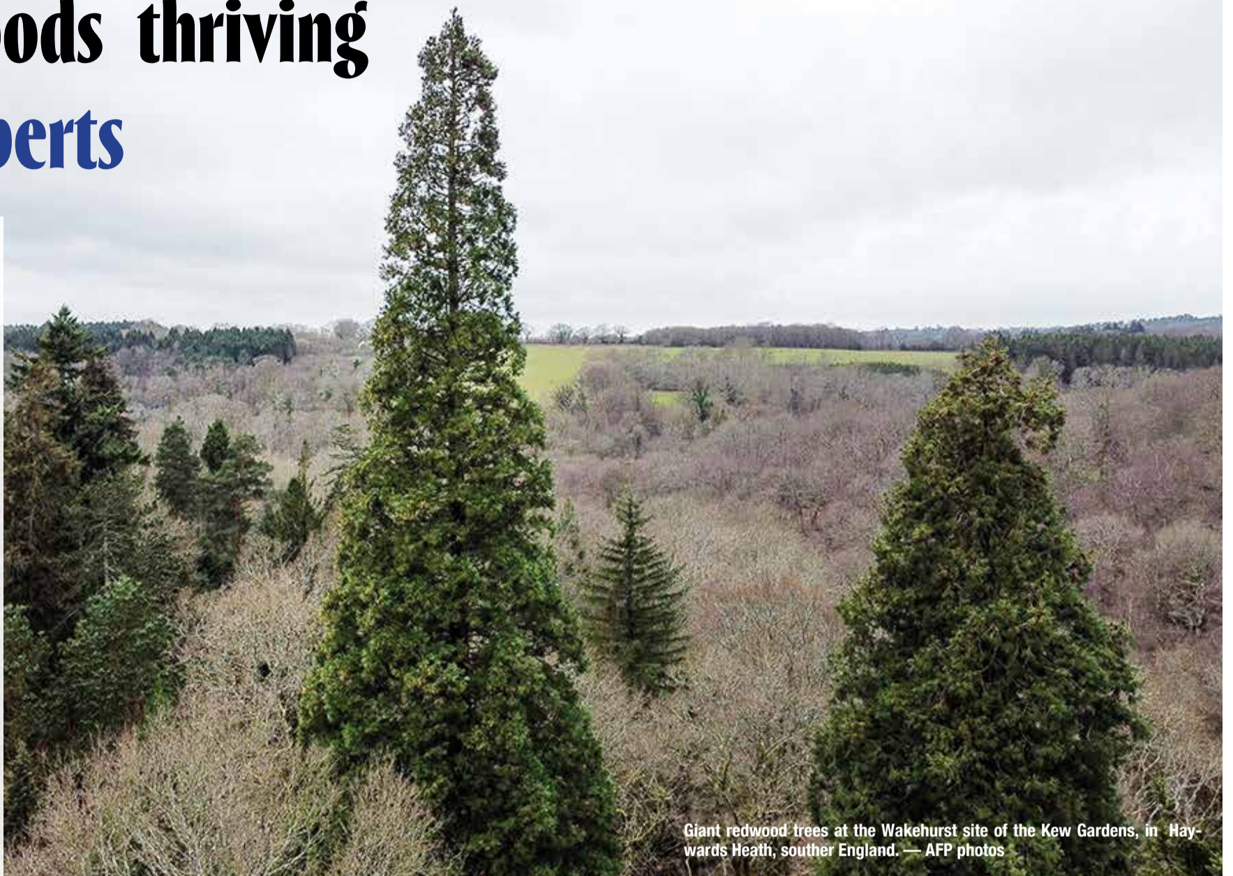
Giant redwood trees at the Wakehurst site of the Kew Gardens, in Haywards Heath, southern England.

To assess the adaptability of giant sequoias to the UK's milder climates and varied