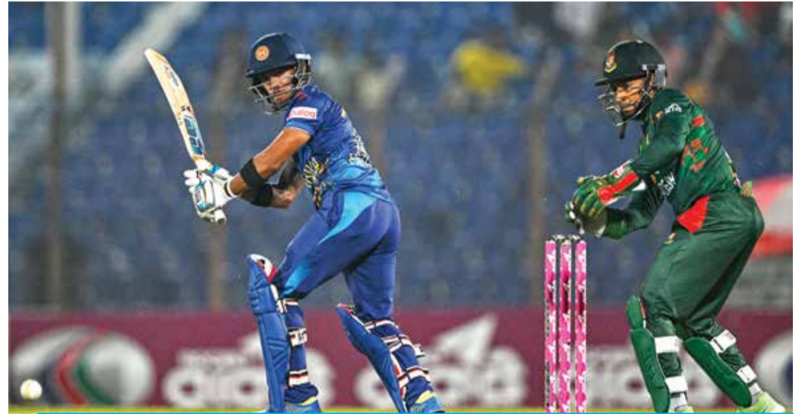
CHITTAGONG: Sri Lanka's Pathum Nissanka (L) plays a shot as Bangladesh's wicketkeeper Mushfiqur Rahim watches during the second one-day international (ODI) cricket match between Sri Lanka and Bangladesh at the Zahur Ahmed Chowdhury Stadium in Chittagong.

Hasaranga bowled Mahmudullah Riyad for a duck two balls later and then trapped heavy-hitter Mushfiqur Rahim leg before for 25 and bowled Mehidy Hasan Miraz for 12. The series decider will be played in Chittagong on Monday before a two-Test series starting in Sylhet on March 22.