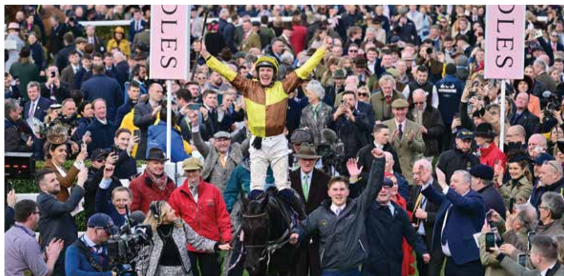
CHELTHENHAM: Jockey Paul Townend celebrates as he arrives in the winner's enclosure after riding Galopin Des Champs to victory in the Cheltenham Gold Cup Steeplechase race on the final day of the Cheltenham Festival at Cheltenham Racecourse, in Cheltenham.

"All we were worried about was the loose horse over the last two fences. "He made one mistake early on but that was it, phew! "To win the 100th one, the week has been so good, it's like a perfect storm," said an emotional Mullins, who also won Tuesday's Champion Hurdle with State Man.