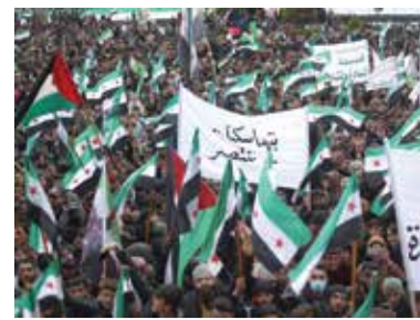
Thousands in Syria's northwest mark 13 years since uprising