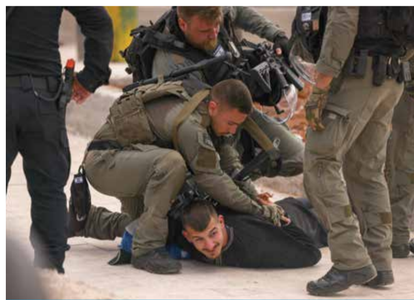
JERUSALEM: Zionist forces detain a Palestinian man near the Damascus Gate as he attempts to enter the Old City to attend the first Friday prayers of Ramadan at the Al-Aqsa mosque.