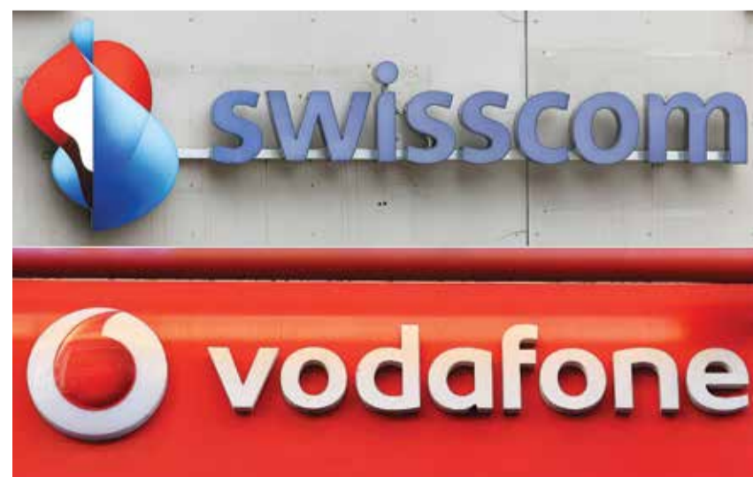
ZURICH: This combination of file photographs shows the logo of Swisscom (top) the logo of Vodafone.