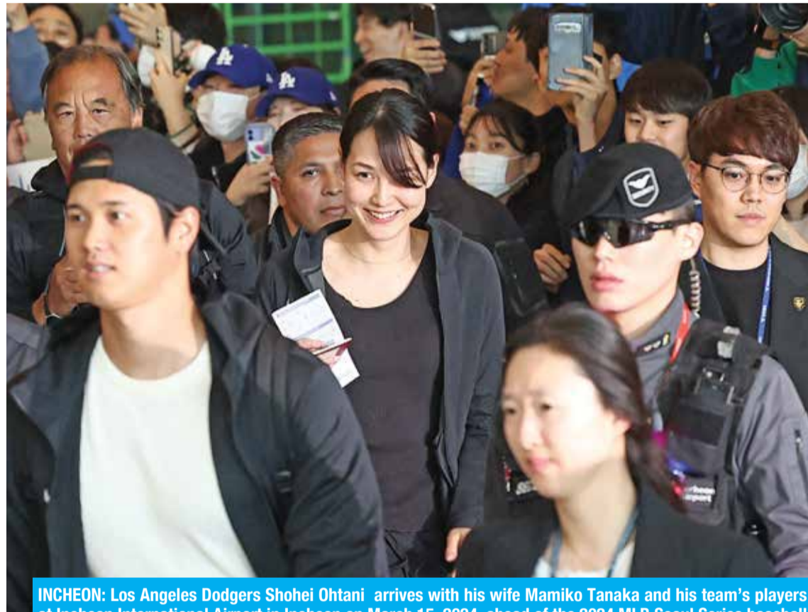
INCHEON: Los Angeles Dodgers Shohei Ohtani arrives with his wife Mamiko Tanaka and his team's players at Incheon International Airport in Incheon on March 15, 2024, ahead of the 2024 MLB Seoul Series baseball games between Los Angeles Dodgers and San Diego Padres.