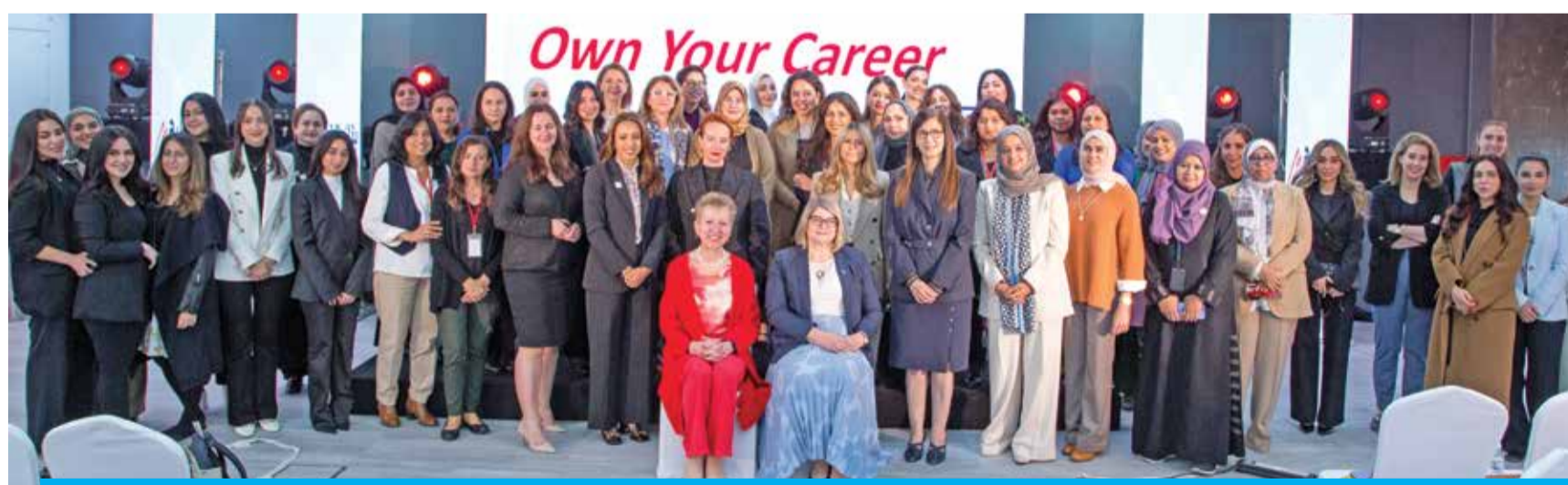
A group photo of Gulf Bank leaders and employees with the Chair of the European Women on Boards and the Ambassador of the European Union delegation to Kuwait.

The International Advertising Association is globally recognized as the sole organization that comprehensively addresses all facets of the advertising and marketing sectors, encompassing client relationships and advertising agency affairs. Additionally, it stands out as the sole entity with a clear vision aimed at advancing the advertising system.