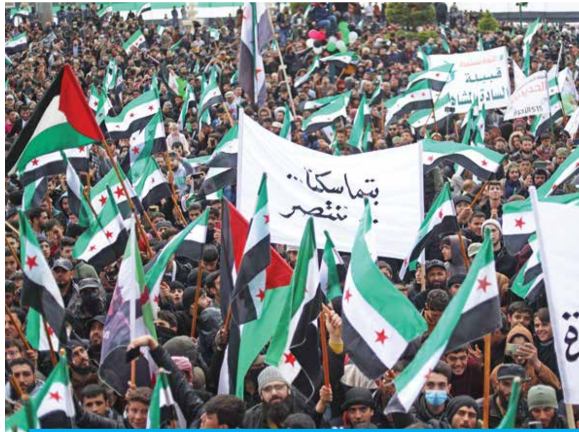
IDLIB: Syrians attend a gathering to mark 13 years since pro-democracy protests swept the country in the rebel-held city of Idlib on March 15, 2024. — AFP

ly backs Putin announced Saturday it was suffering a large-scale hacking attack on its website. The FSB security service also announced a spate of arrests, as polls opened, of Russians it said were aiding Ukrainian forces or planning to carry out sabotage at military and transport facilities. On Saturday, they said they had detained a Russian man who was plotting with Kyiv's help to set explosive devices on a railway line in the country's central Urals region. Ukrainian attacks on Russia have extended well beyond border regions too with Kyiv's forces targeting oil facilities deep inside Russian territory over recent weeks. The governor of the Samara region that lies around 800 kilometers (500 miles) from the front lines said Saturday that Ukrainian drones had targeted two oil refineries, igniting a blaze at one of them. — AFP