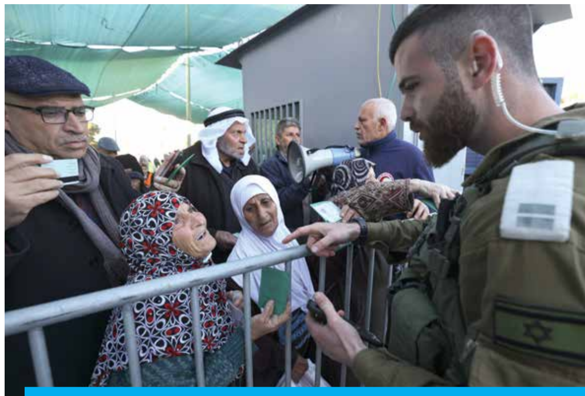
BETHLEHEM: A member of the Zionist security forces checks the identity cards and permits of Palestinians trying to go through a checkpoint in Bethlehem in the occupied West Bank to reach Jerusalem for the Friday prayers.