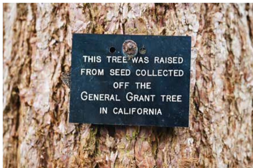
A sign placed on the trunk of a giant redwood tree.