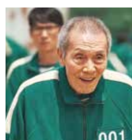
Actor O Yeong-su

"Squid Game", a series that depicts a dark world where marginalized individuals are forced to compete in deadly versions of traditional children's games, quickly gained immense popularity on Netflix.