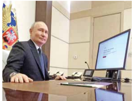
NOVO-OGARYOVO: President Vladimir Putin votes online in the presidential election on March 15, 2024 in this pool photograph distributed by Russia's state agency Sputnik.

Presidential polls opened this week but voting has been marred by an uptick in fatal Ukrainian aerial attacks and a series of incursions into Russian territory by pro-Ukrainian sabotage groups. Fresh bombardments prompted authorities to close schools and shopping centers in the Belgorod region bordering Ukraine, undermining the Kremlin's efforts to isolate Russians from its conflict in its neighbor — particularly during the highly touted elections.