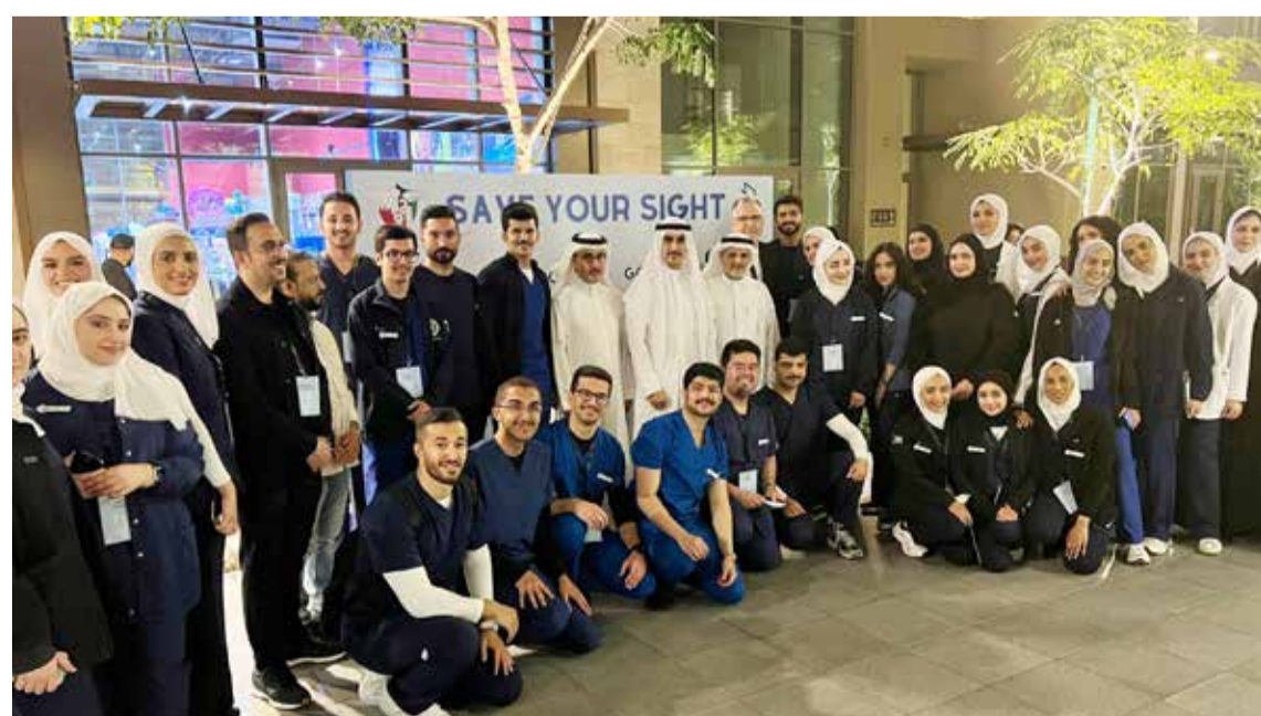
Kuwait Ambassador in Manama takes a group photo with a group of Kuwaiti medical students at the Arabian Gulf University in Bahrain.