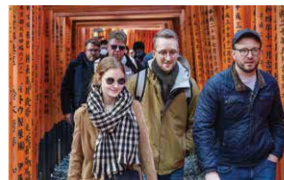
People walk through the Torii path at Fushimi Inari-taisha shrine in Kyoto.