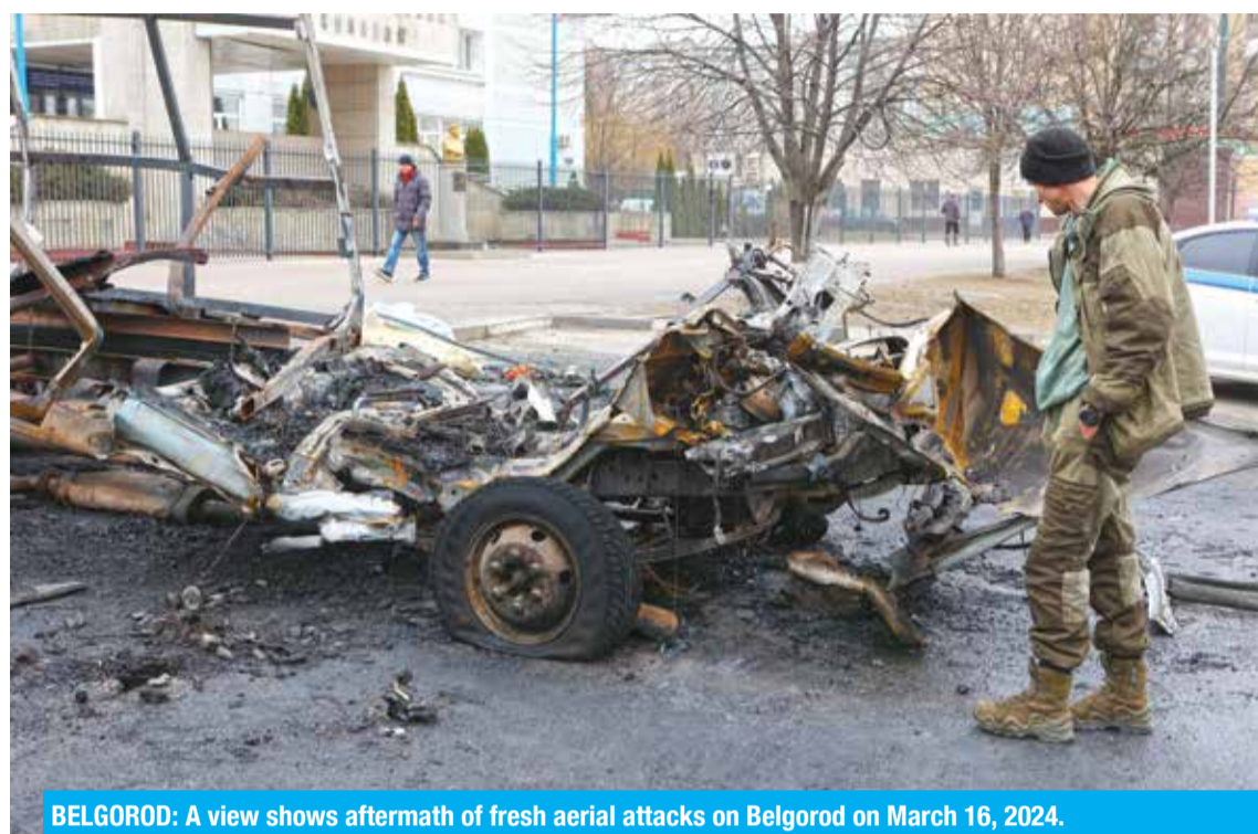
BELGOROD: A view shows aftermath of fresh aerial attacks on Belgorod on March 16, 2024.

If Putin completes another Kremlin term, he would stay in power longer than any Russian leader since Catherine the Great in the 18th century. He is running unchallenged, having barred two candidates who opposed the conflict in Ukraine, and around one month after his main opponent, Alexei Navalny, died in an Arctic prison in unexplained circumstances.