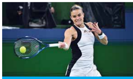
INDIAN WELLS: Greece's Maria Sakkari hits a forehand return to USA's Coco Gauff during their ATP-WTA Indian Wells Masters women's semi-final tennis match at the Indian Wells Tennis Garden in Indian Wells.

Sakkari said sheer determination was key. "I didn't give up," she said. "You can easily lose your head when you lose that second set from being match point up. Things go wrong and I was down a break. Things didn't look right, but