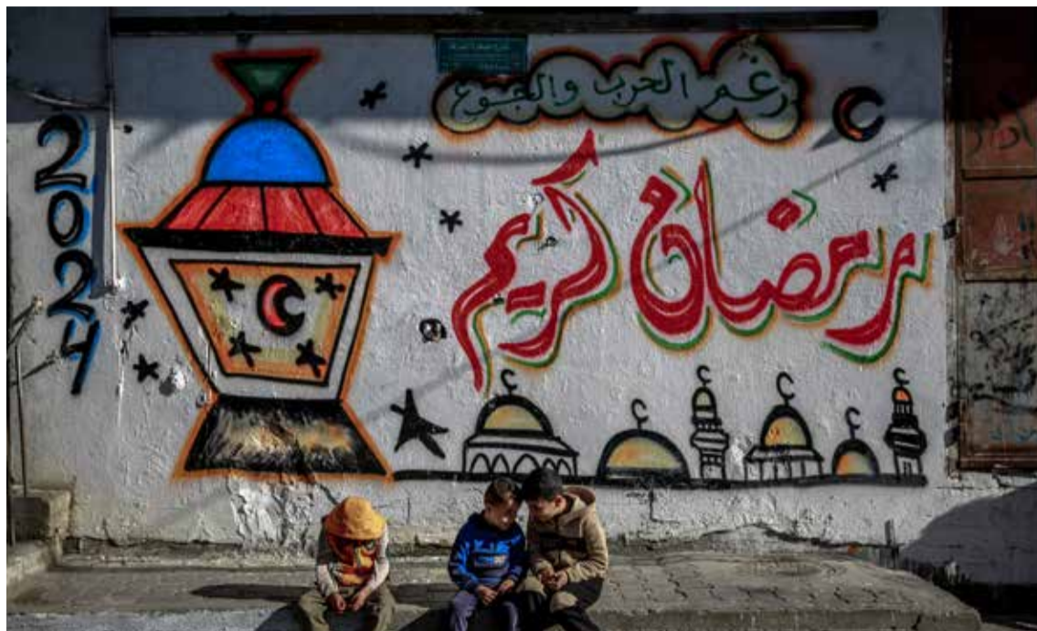
GAZA: Palestinian children sit in front of wall bearing Ramadan theme drawings in Gaza City on March 8, 2024.