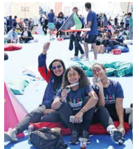
Girls wave Kuwait national flag.

The ministry stated in a press statement that the Minister of Health Dr Ahmad Al-Awadhi supervised the preparations of the ministry's sectors for this major sporting event in which more than 13,000 people participated as the preparations included raising the level of readiness in the main hospitals concerned with the event area such as Al-Sabah and Al-Amiri in addition to the supporting hospitals in the country. - KUNA