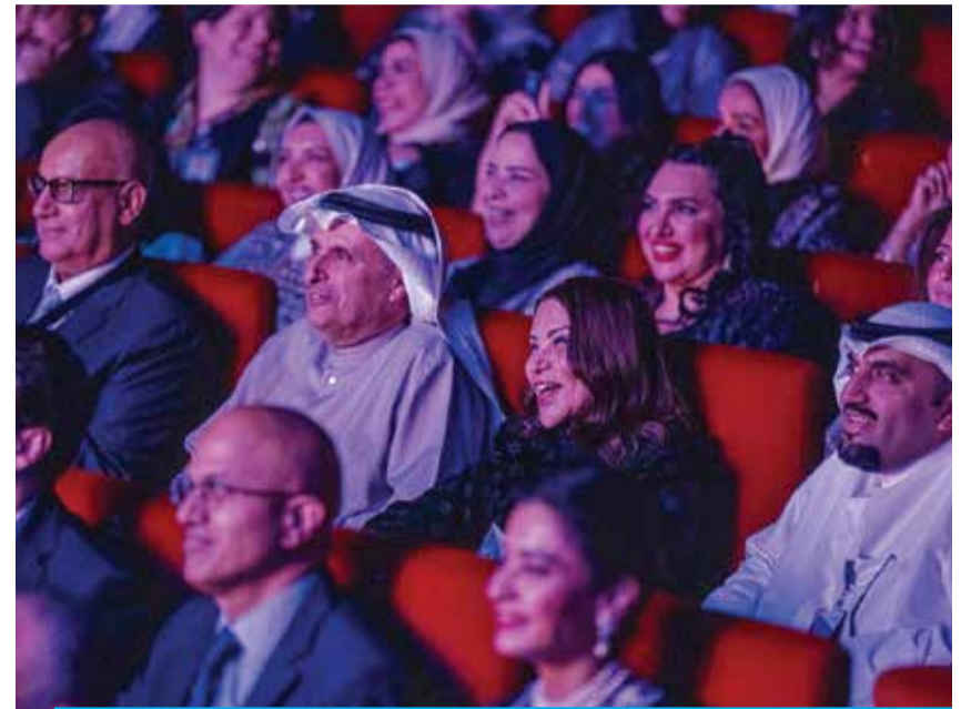
NBK Executive management attends the live performance of the orchestra.

KUWAIT: Following its annual custom at this time every year, with the advent of the holy month of Ramadan, National Bank of Kuwait (NBK) organized its annual "Graish" event for employees last Wednesday evening at Sheikh Jaber Al-Ahmad Cultural Centre (JACC) – National Theatre, in the presence of the bank's executive management.