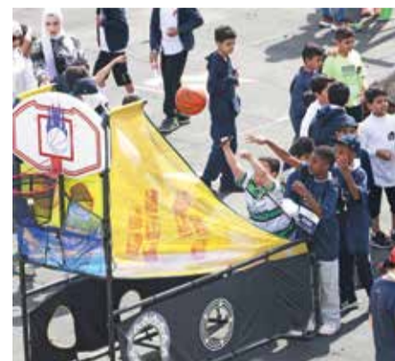
Kids and students enjoy entertainment activities after the race.