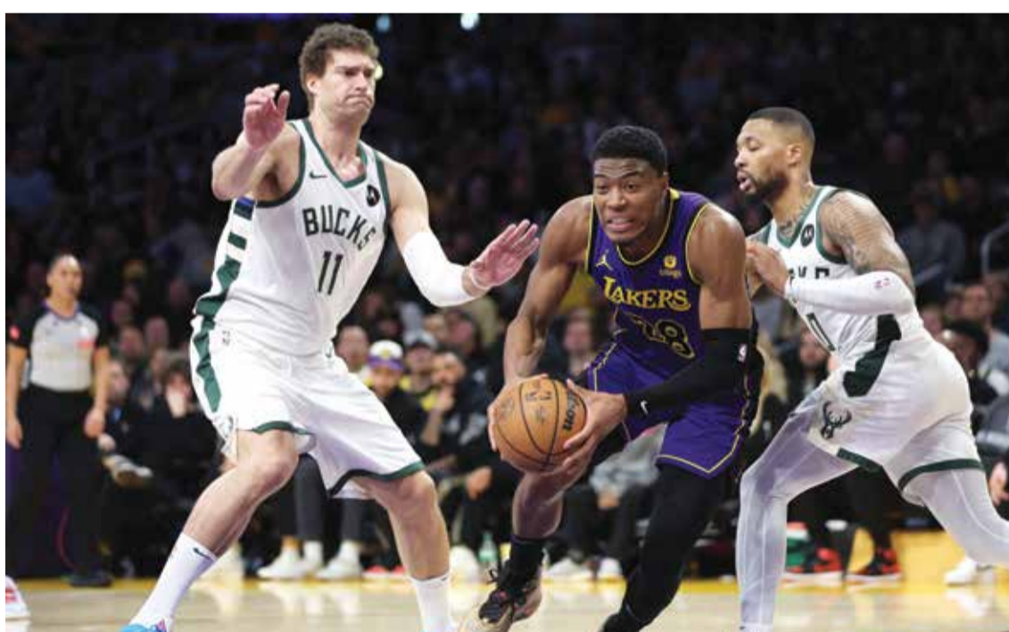
LOS ANGELES: Brook Lopez #11 and Damian Lillard #0 of the Milwaukee Bucks defend against Rui Hachimura #28 of the Los Angeles Lakers during the second half of a game at Crypto.com Arena in Los Angeles, California.

Naz Reid scored a career-high 34 points for Minnesota and Anthony Edwards added 19 but was held scoreless in the fourth quarter and overtime. Meanwhile, Oklahoma City