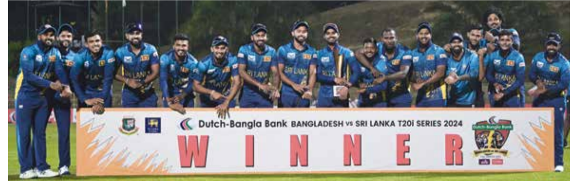
SYLHET: Sri Lanka's cricketers pose with the Twenty20 trophy at the end of the third and last Twenty20 international cricket match between Bangladesh and Sri Lanka at the Sylhet International Cricket Stadium in Sylhet on March 9, 2024.

Those qualities have helped him to the landmark of 700 wickets, including 32 five-wicket hauls, with his scalps coming at an average of 26.52. He has played an England-record 187 Tests so far. What is more, he is still putting his body through the gruelling demands of pace bowling at an age when many of his international contemporaries have long since retired.