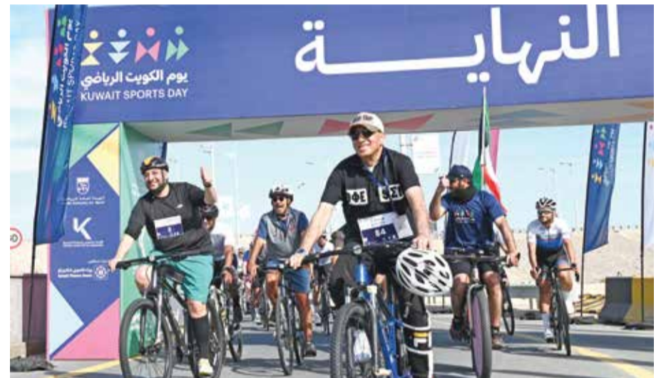
HH the PM alongside Minister of Youth and National Assembly Affairs Dawood Maarafi at the finishing line.