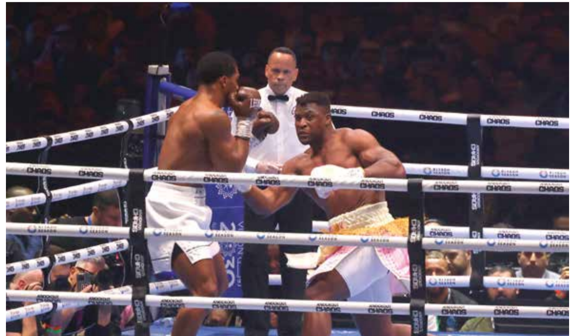
RIYADH: British boxer Anthony Joshua (L) competes with Cameroonian-French boxer Francis Ngannou during their heavyweight boxing match in Riyadh's Kingdom Arena indoor stadium, on March 9, 2024.

However, not every ringside observer was impressed with the brief flurry of brutality. "That high-