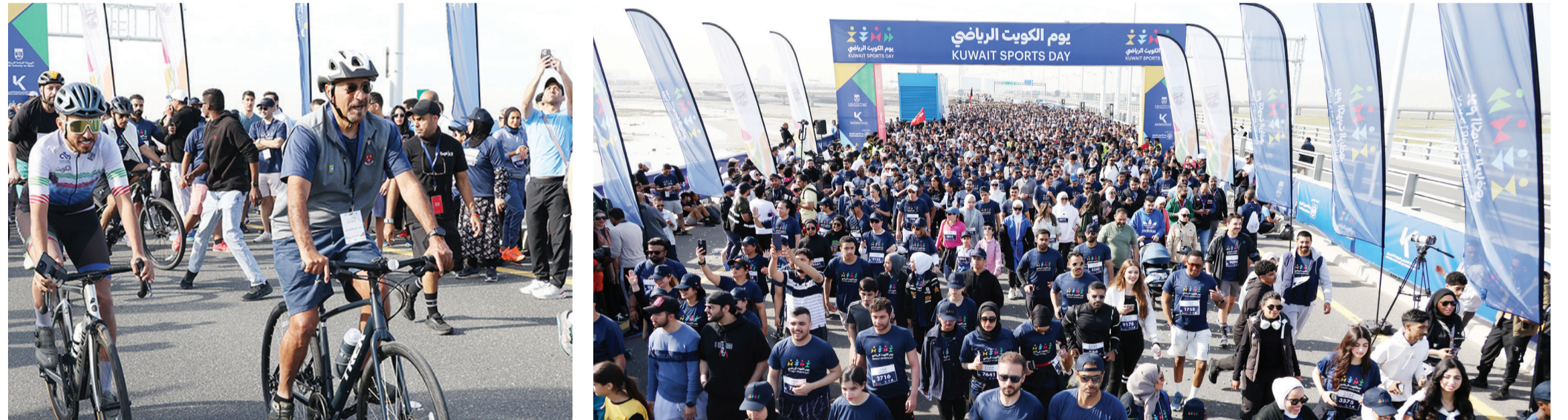
KUWAIT: HH the Prime Minister Sheikh Dr Mohammad Sabah Al-Salem Al-Sabah, along with thousands of participants, rides at the starting point of the first edition of Kuwait Sports Day on Jaber Causeway on March 9, 2024.

Over 13,000 participants make Kuwait Sports Day a smashing success