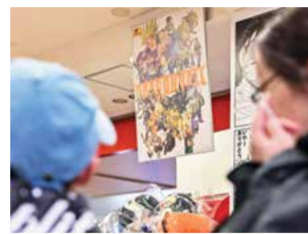
A poster of the popular "Dragon Ball" manga franchise hangs in a shop in downtown Tokyo.