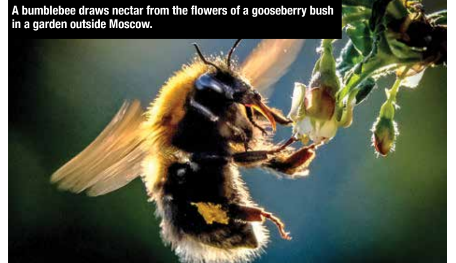
A bumblebee draws nectar from the flowers of a gooseberry bush in a garden outside Moscow.

Bridges said the studies "can't help but fundamentally challenge the idea that cumulative culture is this extremely complex, rare ability that only the very 'smartest' species—e.g. humans—are capable of". Thornton said the research again showed how "people habitually overestimate their abilities relative to those of other animals".—AFP