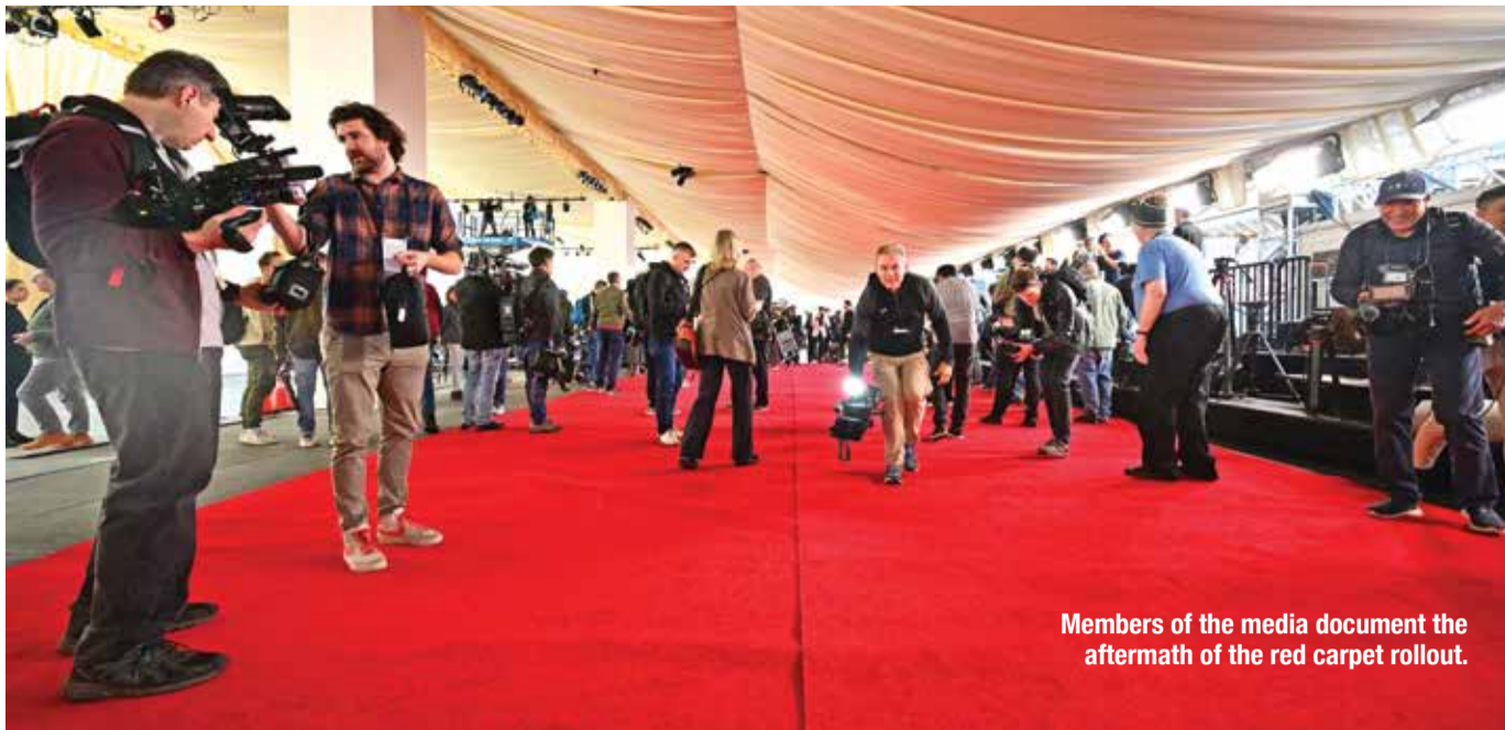
Members of the media document the aftermath of the red carpet rollout.