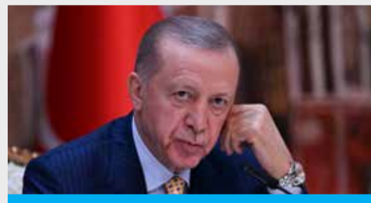
Turkish President Recep Tayyip Erdogan

ISTANBUL: Turkey's President Recep Tayyip Erdogan on Friday said that the country's March local elections would be his last, suggesting an end to his more than two decades in power. It was the first time that Erdogan, who has been in power since 2003, has spoken about leaving office.