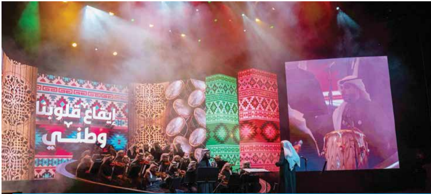
National songs were strongly present in the country.

Executive management attends the event held at JACC