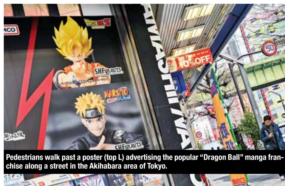
Pedestrians walk past a poster (top L) advertising the popular "Dragon Ball" manga franchise along a street in the Akihabara area of Tokyo.