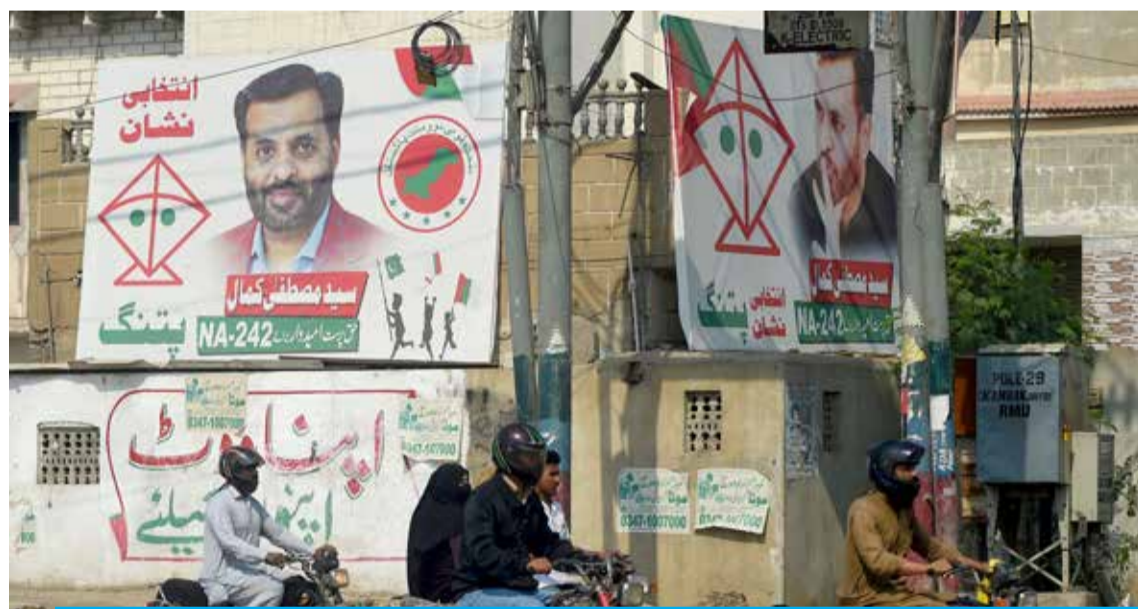
KARACHI: Commuters ride past election campaign posters of Syed Mustafa Kamal, senior deputy convener of the Muttahida Qaumi Movement-Pakistan (MQM-P) party, along a street in Karachi.

In return for supporting the military-backed Pakistan Muslim League-Nawaz (PML-N), analysts predict the