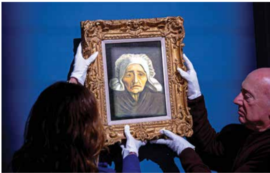
Personnel members hang for display a rare Vincent van Gogh painting, "Tete de paysanne a la coiffe blanche" (Head of an old farmer's wife with a white hat), painted circa 1884, that will be auctioned at the TEFAF Maastricht art fair, in Maastricht.