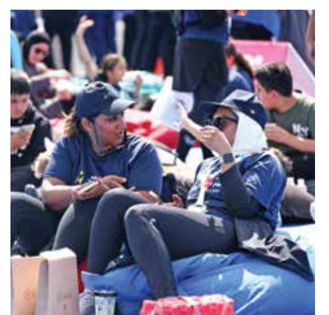
Women rest after the marathon.