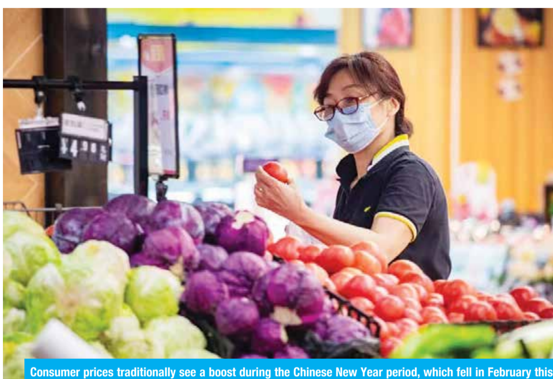
Consumer prices traditionally see a boost during the Chinese New Year period, which fell in February this year.

"During the Spring Festival period, consumer demand for food products grew, in addition to