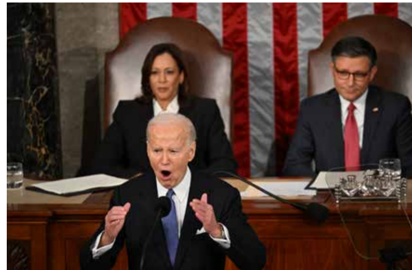
WASHINGTON: US President Joe Biden delivers the State of the Union address in the House Chamber of the US Capitol in Washington, DC, on March 7, 2024.

Trump, 77, hit back at Biden on Friday, saying Biden was a "psycho" and saying his speech was "getting 'panned' all over the world," without offering any examples. Trump has said that he will debate Biden on television "anytime" but Biden