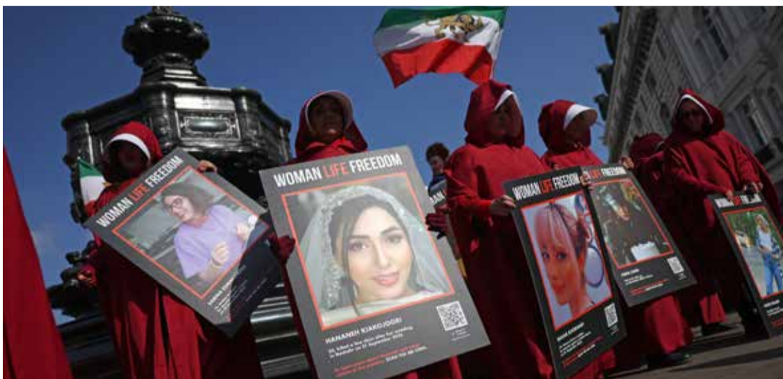
LONDON: Protesters dressed as characters from The Handmaid's Tale TV series hold placards at a demonstration calling for women's rights in Iran. — AFP photos

In the last three years, hundreds of schoolchildren and college students have been kidnapped in mass abductions in the northwest and central region, including in Kaduna. Almost all were released for ransom payments after weeks or months spent in captivity at bandit camps hidden in the forests that stretch across northwestern states. — AFP