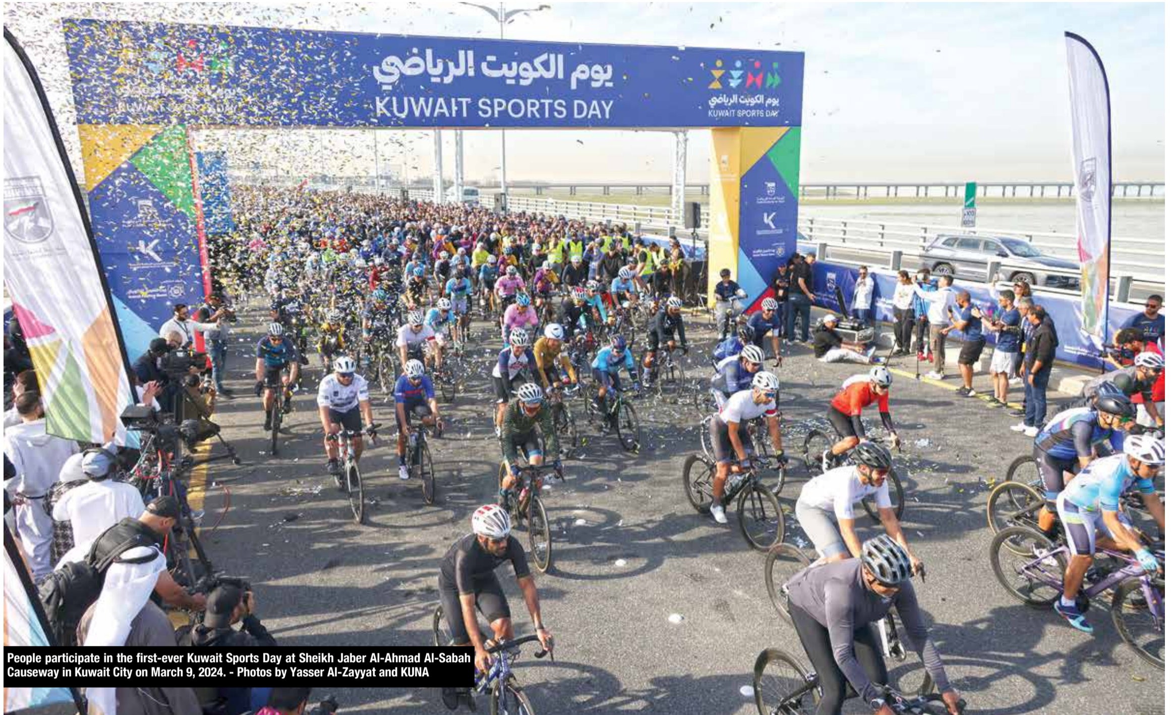
People participate in the first-ever Kuwait Sports Day at Sheikh Jaber Al-Ahmad Al-Sabah Causeway in Kuwait City on March 9, 2024.