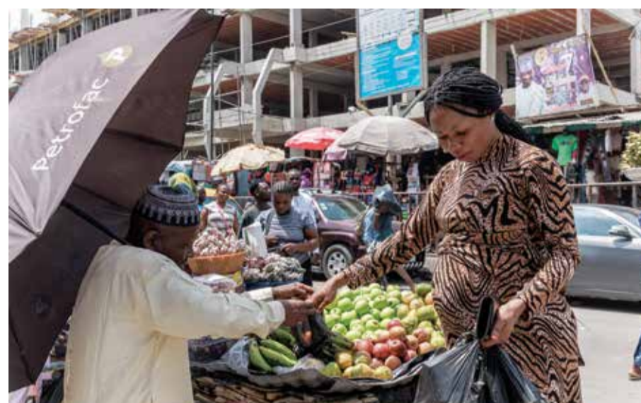
LAGOS: A woman buys fruits at the Lagos Island market in Lagos on March 8, 2024 ahead of the holy fasting month of Ramadan. — AFP

He warned the economic crisis was fuelling other problems in Nigeria, including kidnappings for ransom. "It's an economic factor and can be political. The rate of employment is high—industries are closing," he said. Nigeria's latest mass kidnapping took place on Thursday in the northwestern state of Kaduna, where gunmen abducted more than 250 school pupils. At least 63 percent of Nigeria's population lives in extreme poverty, according to the national bureau of statistics. — AFP