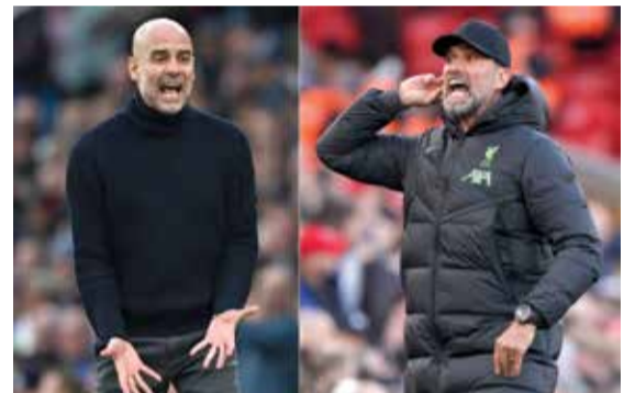
LONDON: (COMBO) In this combination of file images created shows, Manchester City's manager Pep Guardiola gestures on the touchline and Liverpool's German manager Jurgen Klopp reacts during the English Premier League football match between Liverpool and Burnley.

Despite working with a smaller budget at Liverpool and previously Borussia Dortmund, compared with the backing Guardiola has enjoyed at City and Bayern Munich, Klopp has the better personal head-to-head record. The German has 12 wins to Guardiola's 11, with six draws in 29 meetings between the pair. But despite having the edge, Klopp hailed Guardiola as the standout coach of his generation. "In my lifetime he's the outstanding manager, definitely," Klopp said at his pre-match press conference on Friday.