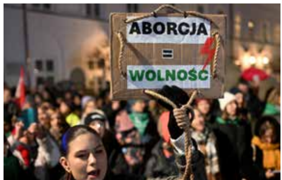
WARSAW: A woman holds a placard reading as 'Abortion is freedom' during a rally calling for the right to abortion.

FRANCE: President Emmanuel Macron presided over a ceremony enshrining the right to abortion into the French constitution, the first country to make such a move. "We will not rest until this promise is held everywhere in the world," he said.