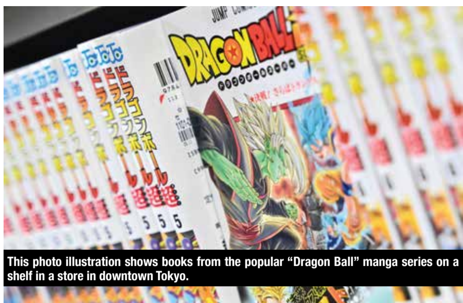
This photo illustration shows books from the popular "Dragon Ball" manga series on a shelf in a store in downtown Tokyo.