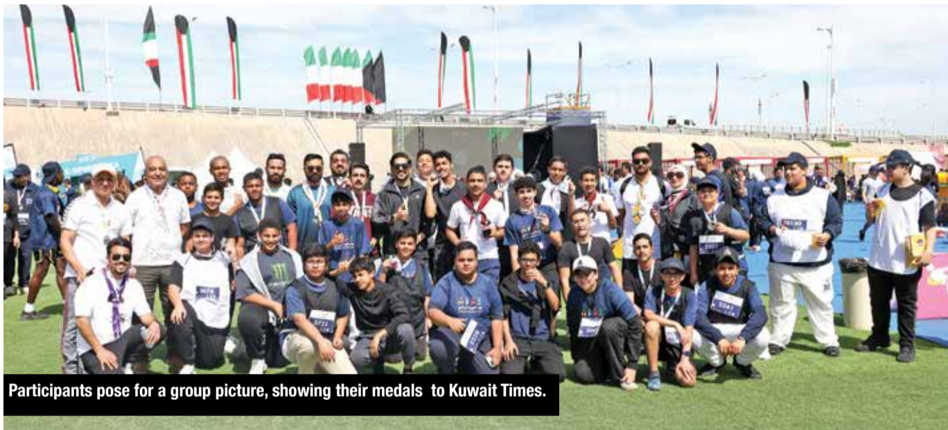
Participants pose for a group picture, showing their medals to Kuwait Times.