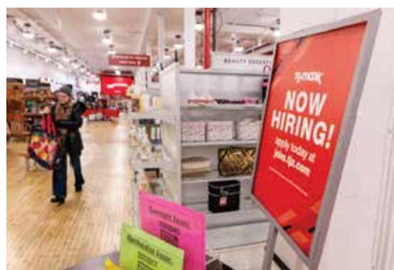
NEW YORK: A 'now hiring' sign is displayed in a retail store in Manhattan in New York City.

Even though the revisions showed less strength in employment growth, Rubeela Farooqi of High Frequency Economics noted that the market "continues to create jobs at a fast rate." A "soft landing" for the economy would be positive news for Biden as he seeks reelection in November. While the jobless rate rose slightly to 3.9 percent, the highest since January 2022, it remains on the lower end when compared with levels over the past