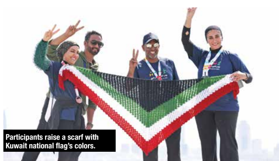
Participants raise a scarf with Kuwait national flag's colors.