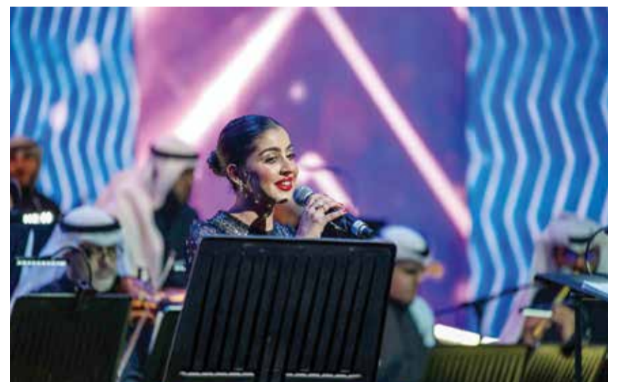
The national talents excelled in singing with the orchestra.

CEO of National Bank of Kuwait in which he extended greetings to all employees on the advent of Ramadan.