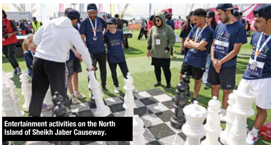
Entertainment activities on the North Island of Sheikh Jaber Causeway.