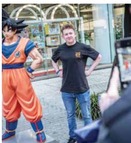
A tourist wearing a T-shirt of Dragon Ball has his photographs taken with a statue of Dragon Ball character "Son Goku" in Tokyo.