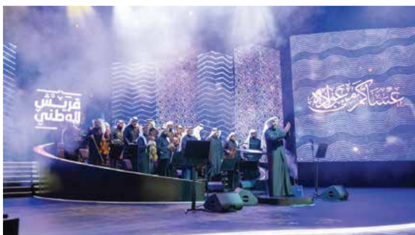
The event underscored the one-family spirit and cooperation among NBK employees.

Recognizing employees' efforts and strengthening relationships among them is at the core of NBK's strat-