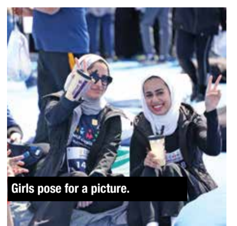
Girls pose for a picture.