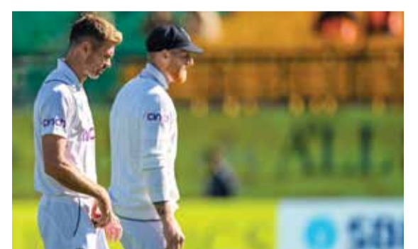
DHARAMSALA: England's James Anderson (L) and captain Ben Stokes walk during the third day of the fifth and last Test cricket match between India and England at the Himachal Pradesh Cricket Association Stadium in Dharamsala on March 9, 2024.

"He would hold the ball as if he is bowling an out-swinger," said Tendulkar. "But the release point, he would try and bring the ball back in." And what is more,