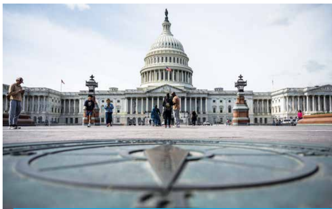
WASHINGTON: The US Capitol in Washington, DC, on March 8, 2024. US senators were racing against the clock March 8 to vote on a package of funding bills for key federal agencies to avert a partial government shutdown ahead of a midnight deadline.

Paris and Frankfurt also hit record highs Thursday after European Central Bank chief Christine Lagarde hinted at cuts to eurozone interest rates starting in