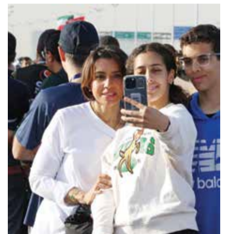
Participants take selfies.