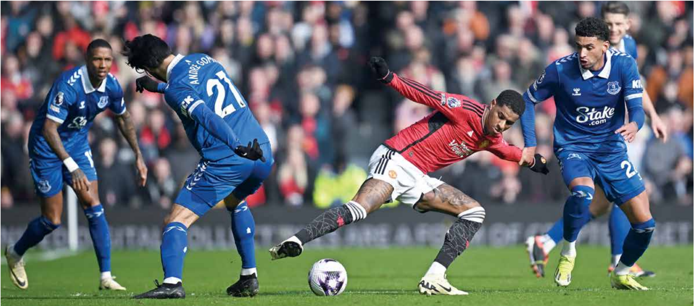
MANCHESTER: Manchester United's English striker #10 Marcus Rashford (C) vies with Everton's Portuguese midfielder #21 Andre Gomes (2L) and Everton's English midfielder #22 Ben Godfrey (R) during the English Premier League football match between Manchester United and Everton at Old Trafford in Manchester, north west England, on March 9, 2024.