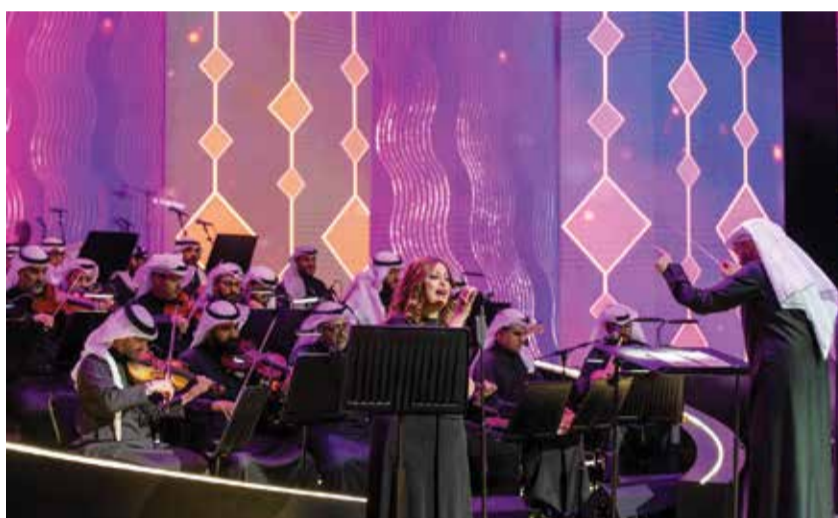
Live performance by an orchestra at Sheikh Jaber Al-Ahmad Cultural Centre (JACC) – National Theatre, in the presence of the bank's executive management.