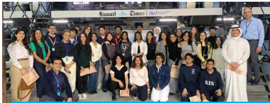
A group photo of students of 'Young Ambassadors' program with the Kuwait Times team at Kuwait Times printing press. — Photo by Yasser Al-Zayyat

Al-Ajmi confirmed that the goal of the center is to provide a comprehensive primary healthcare and is not limited to treating urgent and emergency cases, but extends to include chronic disease clinics, a small operating room, and a large observation room. — KUNA