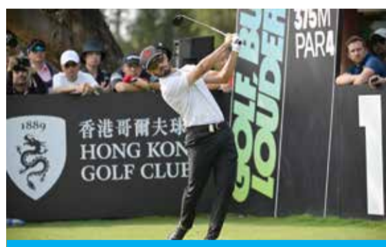
HONG KONG: LIV team Fireballs GC player Abraham Ancer hits a tee shot during the LIV Golf tournament at Fanling golf club in Hong Kong.

At that point he was in a three-way tie at the top,