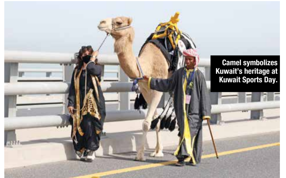
Camel symbolizes Kuwait's heritage at Kuwait Sports Day.