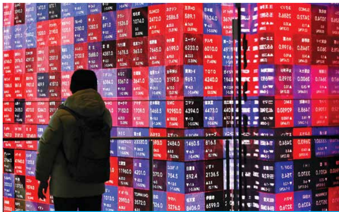
TOKYO: A man looks at an electronic board displaying stock prices of companies listed on the Tokyo Stock Exchange in Tokyo.

Turning to competition with China, Biden pointed to his own actions to curb exports of advanced technology. "Frankly, for all his tough talk on China, it never occurred to my predecessor to do any of that," Biden said, referring to Trump. He added that Washington is in a "stronger position" to win against China than anyone else, though stressing he did not seek conflict with the second biggest economy. On the domestic front, the president said he wanted to provide an annual tax credit to help Americans with housing costs. He highlighted his efforts to reduce unfair pricing and junk fees too, in an appeal to millions of Americans tuning in — with many still feeling the pinch from lingering inflation. A phenomenon he seeks to curb is "shrinkflation," where companies reduce the size of products to obscure price hikes. The practice drew ire even from popular Sesame Street children's character Cookie Monster this week, who complained about it in a widely reported social media post.