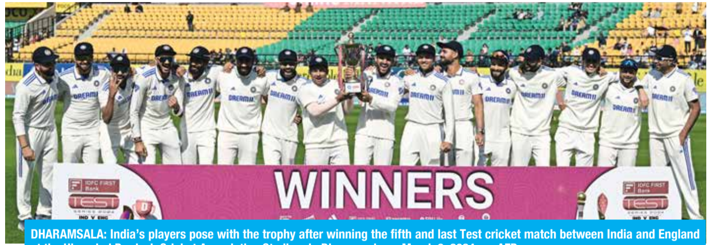
DHARAMSALA: India's players pose with the trophy after winning the fifth and last Test cricket match between India and England at the Himachal Pradesh Cricket Association Stadium in Dharamsala on March 9, 2024.

"We've got to nurture them and make them understand the game.