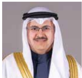
Sheikh Feras Al-Sabah

KUWAIT: Minister of Social Affairs, Family and Children Affairs Sheikh Feras Saud Al-Sabah said Friday that women play a fundamental role in progressing and building the state for a better future. On International Women's Day, Sheikh Feras, Chairman of Supreme Council of Family Affairs, congratulated Kuwaiti women as an essential partner in development, stressing that Kuwait has been paying much attention to women and keen on empowering them for their positive role in all domains. Women have made several achievements in multiple fields, and taken part in setting national strategies, the minister said.