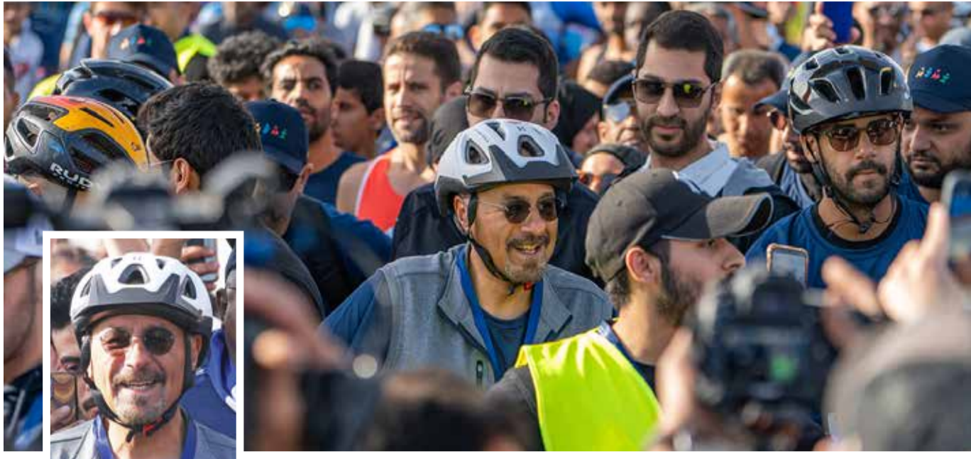
HH the Prime Minister Sheikh Dr Mohammad Sabah Al-Salem Al-Sabah participates in Kuwait Sports Day.