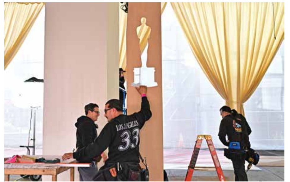
Preparations are underway for setting up the red carpet arrivals area ahead of the 96th Annual Academy Awards at the Dolby Theatre in Hollywood, California.