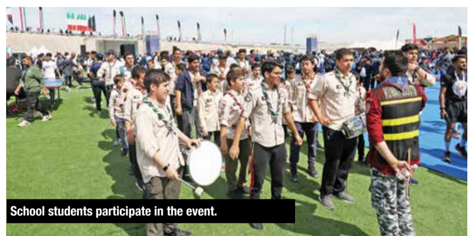
School students participate in the event.

He stressed his keenness to participate in the walkathon and complete it, expressing his wishes to see more of these events in Kuwait throughout the year that will positively impact the society, noting diplomatic corps members' eagerness to support all activities and events that take place in Kuwait. — KUNA