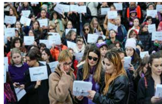
PARIS: French actress Judith Godreche (front left) flanked by demonstrators holding placards displaying names of victims of femicide take part in a protest.