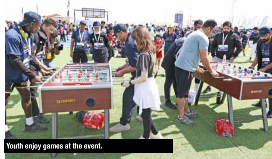
Youth enjoy games at the event.