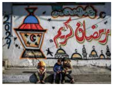
Gaza war robs Muslims of Ramadan joy