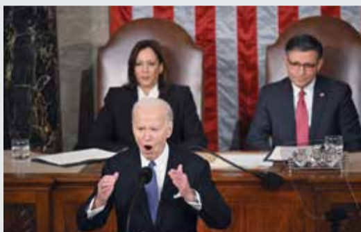
WASHINGTON, DC: US President Joe Biden delivers the State of the Union address in the House Chamber of the US Capitol in Washington, DC, on March 7, 2024. — AFP

Conservatives were demanding that the leadership in both parties allow a vote on reinstating an earmark ban overturned by Democrats in 2021, effectively stripping more than $12 billion from the bill. They highlighted examples of what they see as profligate spending, including $1 million for an environmental justice center in New Jersey, $4 million for a waterfront walkway in New Jersey and $3.5 million for a Thanksgiving parade in Michigan. — AFP