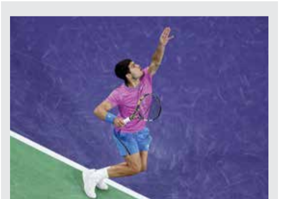
INDIAN WELLS: Carlos Alcaraz of Spain serves against Matteo Arnaldi of Italy in their second round match during the BNP Paribas Open at Indian Wells Tennis Garden in Indian Wells, California.

And they nearly conceded a third penalty in stoppage time when Rashford was wiped out by Jarrad Branthwaite, but the offside flag came to Everton's rescue.