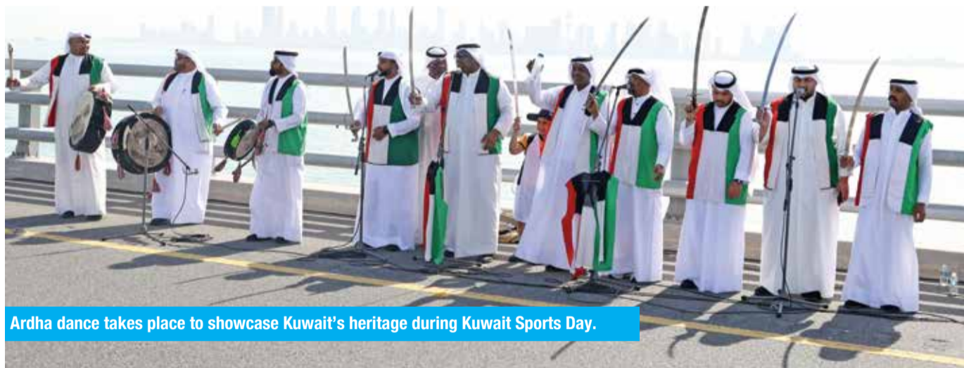
Ardha dance takes place to showcase Kuwait's heritage during Kuwait Sports Day.