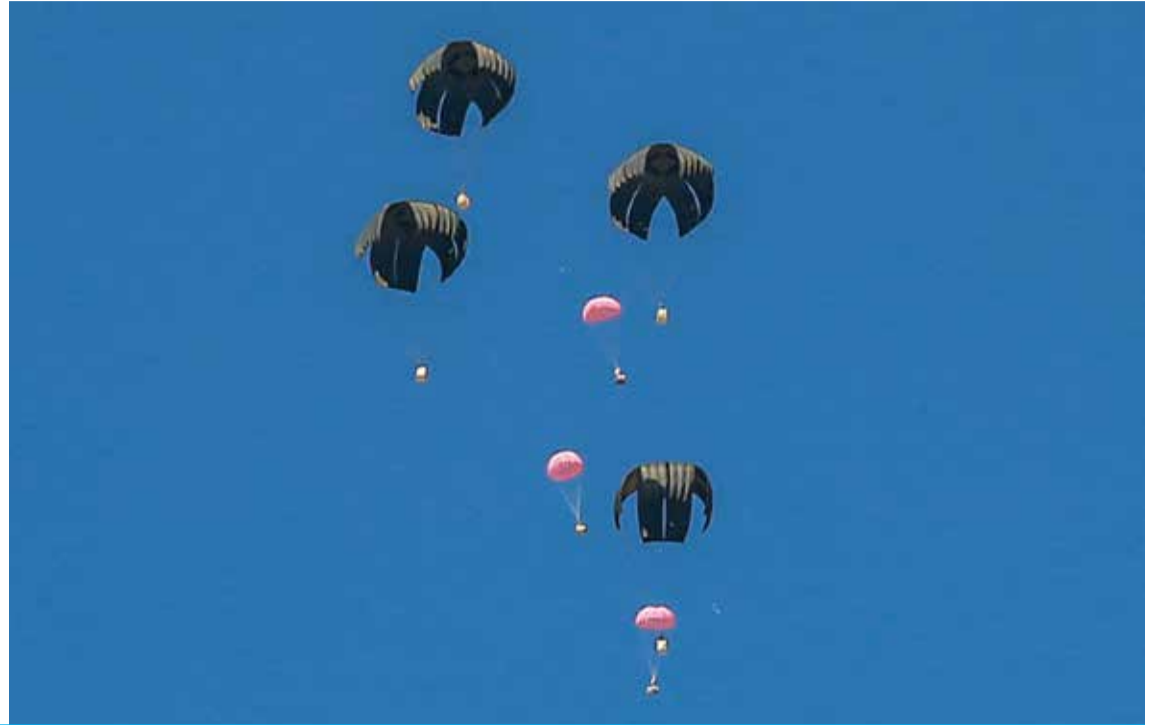
RAFAH/GAZA: (Left) Palestinians walk away with some items salvaged from the rubble of a residential building hit in an overnight Zionist air strike in Rafah on March 9, 2024. (Right) Aid parcels are airdropped over the northern Gaza Strip on March 8, 2024.