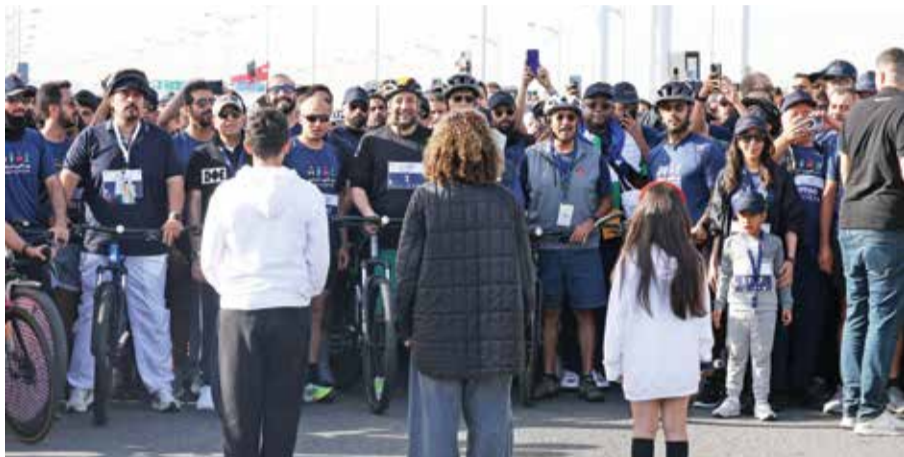
His Highness the Prime Minister Sheikh Dr Mohammad Sabah Al-Salem Al-Sabah listens to girls singing the Kuwaiti national anthem.

This event served as a unifying platform, bringing together people of all categories and ages, from children to adults, in a spirit of solidarity and good health. The high energy and inspiration drawn from HH the Prime Minister Sheikh Dr Mohammad Sabah Al-Salem Al-Sabah uplifted the atmosphere and encouraged a sense of pride and togetherness among the people.