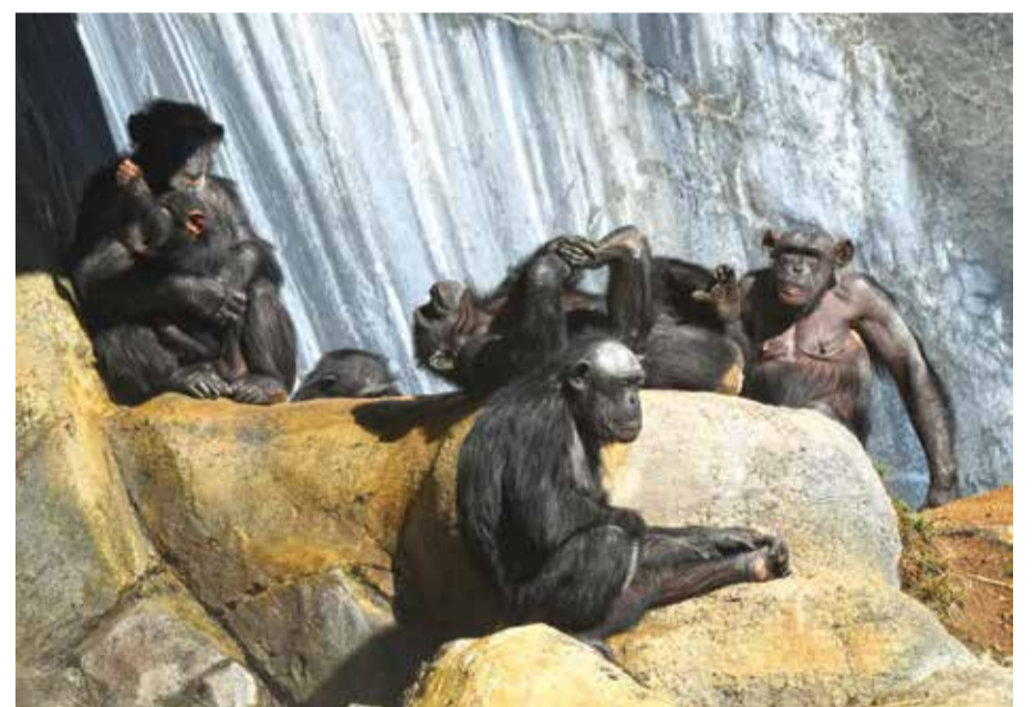
Chimpanzees bask under the sun in their enclosure at the Los Angeles zoo in California.

The demonstrators were then paired up with some new "naive" bees, which watched the demonstrators solve the puzzle before having a go themselves. Five of the 15 naive bees swiftly completed the puzzle—without