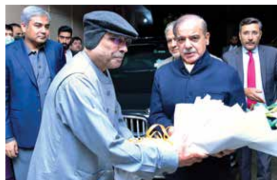
ISLAMABAD: This handout photograph by Pakistan's Press Information Department shows the country's newly sworn-in Prime Minister Shehbaz Sharif greeting their newly-elected President Asif Ali Zardari.

He has spent more than 11 years in jail, a long time even by the standards of Pakistani politicians, with a wheeler-dealer's talent for bouncing back after scandals. Back in 2009, the New York Times said he had a knack for "artful dodging" — "maneuvering