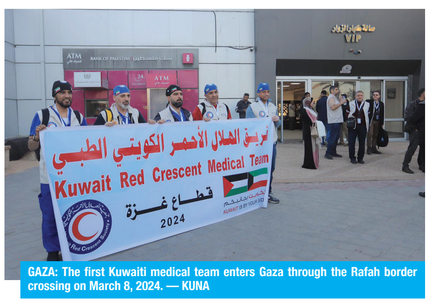
GAZA: The first Kuwaiti medical team enters Gaza through the Rafah border crossing on March 8, 2024.