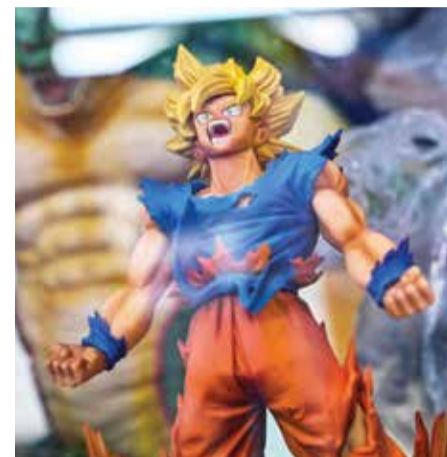
A figurine character from the popular "Dragon Ball" manga franchise sits for sale inside a glass case at a shop in downtown Tokyo.

Anime journalist Tadashi Sudo told AFP that for many manga artists, Toriyama was "a role model". "Toriyama knew exactly what everybody wants to read - adventure and the growth of characters," he said. "Many people - not only creators in Japan, but those abroad - saw in his works the culmination of what entertainment should be like," Sudo said. — AFP