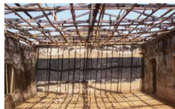
KURIRIGA, Nigeria: A general view of a classroom at Kuriga school in Kuririga on March 8, 2024, where more than 250 pupils kidnapped by gunmen.

She denounced the regimes in Iran and Afghanistan for having "systematically ... orchestrated conditions of suppression, domination, tyranny (and) discrimination against women".