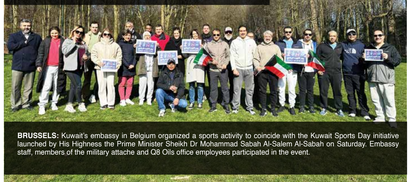
BRUSSELS: Kuwait's embassy in Belgium organized a sports activity to coincide with the Kuwait Sports Day initiative launched by His Highness the Prime Minister Sheikh Dr Mohammad Sabah Al-Salem Al-Sabah on Saturday. Embassy staff, members of the military attaché and Q8 Oils office employees participated in the event.