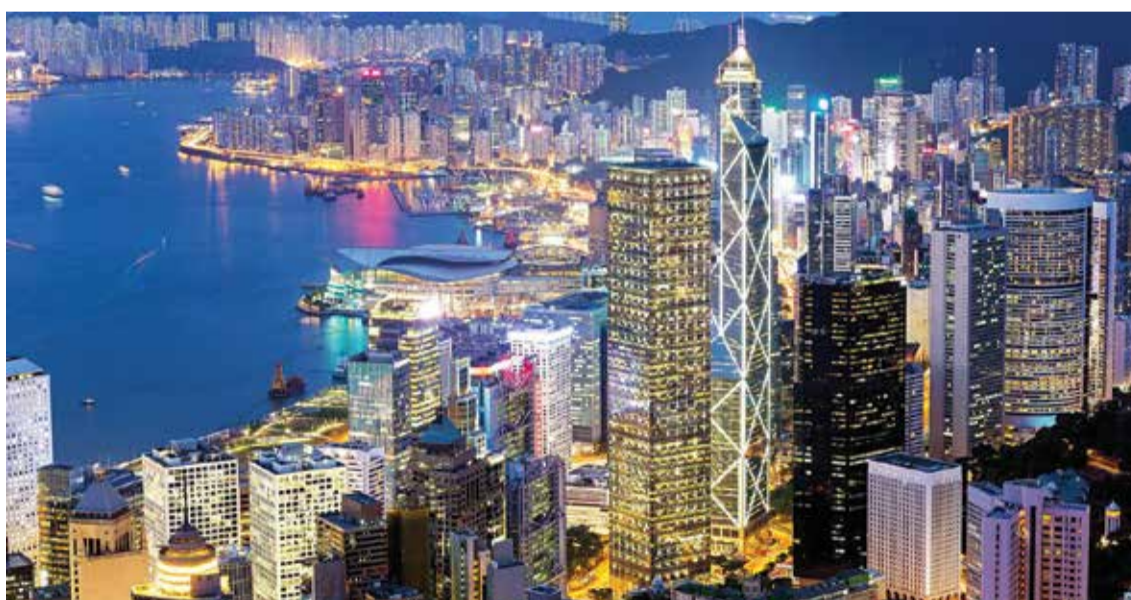
HONG KONG: As Hong Kong fast-tracks a new national security law, the legislation and questions about its implementation have raised fears among the business community.

AFP sought comments from members of the business and diplomatic communities during a one-month public