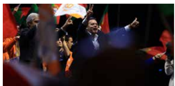
LISBON: Democratic Alliance (AD) leader Luis Montenegro flashes the victory sign to supporters at the end of the last rally of the electoral campaign in Lisbon on March 8, 2024. (Right) Chega far-right party leader Andre Ventura (center) waves as he takes part in a street rally.

"The positive macroeconomic context is not reflected in the quality of life of the Portuguese because of