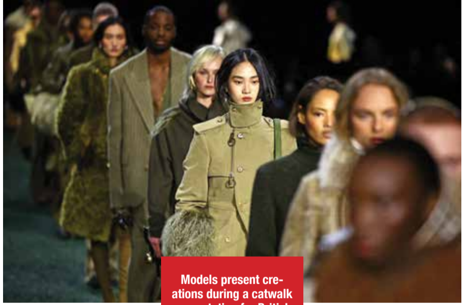
Models present creations during a catwalk presentation for British fashion house Burberry's Autumn/Winter 2024 collection, at London Fashion Week in London.