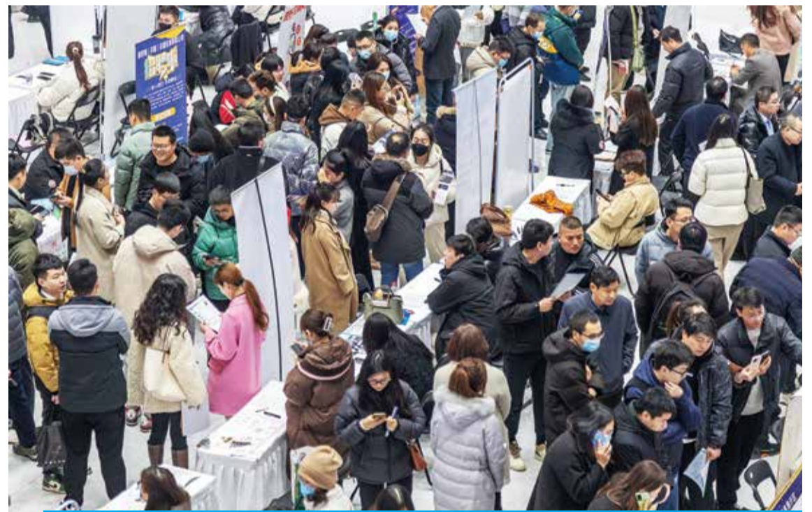
ZHENGZHOU, China: People attend a job fair in Zhengzhou, in central China's Henan province on February 19, 2024.

"We recognize the urgency to address climate change and protect biodiversity, and this is why our