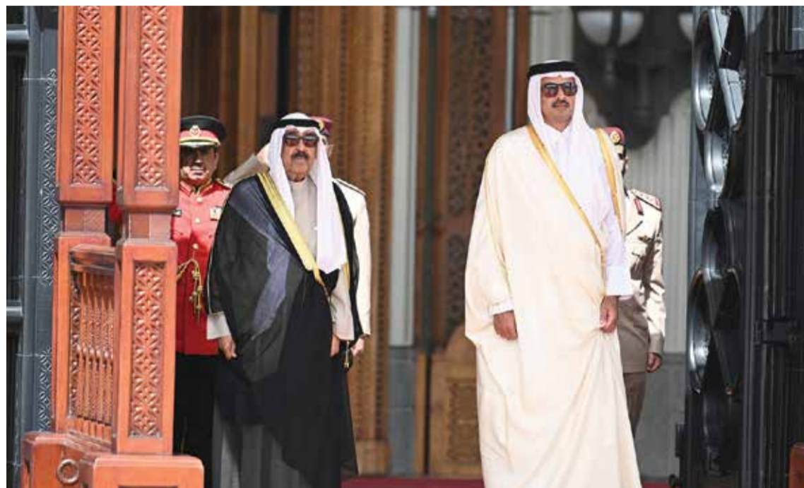
DOHA: His Highness the Amir Sheikh Mishal Al-Ahmad Al-Jaber Al-Sabah and Qatari Amir Sheikh Tamim bin Hamad Al-Thani hold talks. During the official talks, they reviewed fraternal relations between Kuwait and Qatar and ways of promoting existing cooperation between both countries.