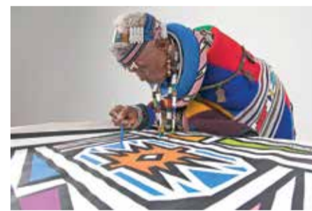
Artist Esther Mahlangu

Mahlangu's first big international break came in 1989, when she was 54. Her ornately decorated house had caught the eye of French researchers who invited her to the Pompidou Centre. However, South Africa was not quick to recognize Mahlangu's talent - she gained international prominence at a time when the art scene in her home country was focused on contemporary styles.