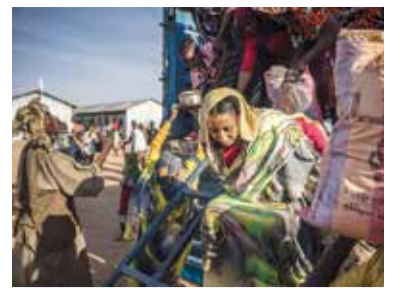
Grueling wait for Sudanese refugees in S Sudan camps