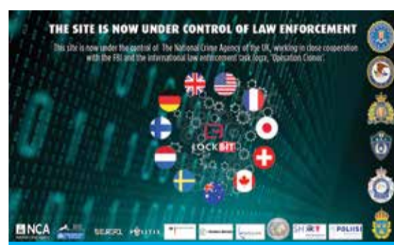
LONDON: A handout picture released by Britain's National Crime Agency (NCA) in London on February 20, 2024 shows a screen shot of the seized cyber crime group 'LockBit' site. — AFP

But the operator depends on RaaS developers like Hive or Lockbit, which have the programming skills to create the malware needed to carry out the operation and avoid counter-security measures. Typically, their programs — once inserted by the ransomware oper-