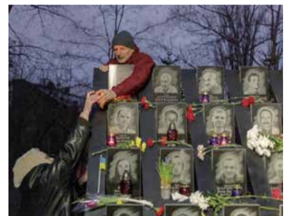
People light candles at the memorial of the Maidan activists.

Biden has said another Ukrainian town could fall