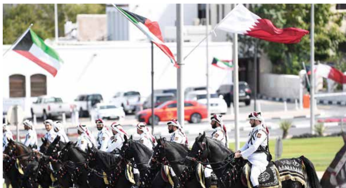
An official reception was held for His Highness the Amir Sheikh Mishal Al-Ahmad Al-Jaber Al-Sabah at the Qatari Amiri Diwan on Tuesday on the occasion of his state visit to Qatar.