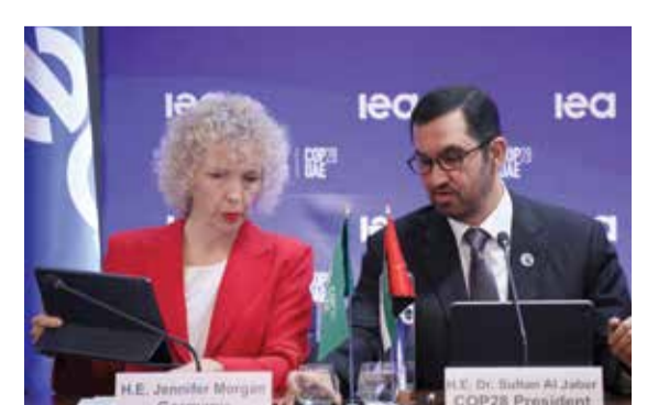
PARIS: COP28 president Sultan Ahmed Al-Jaber talks to state secretary and special envoy for International Climate Action Jennifer Morgan (left) during a high-level round table on COP energy and climate commitments organized by the International Energy Agency (IEA) at its headquarters in Paris on Feb 20, 2024.

With impacts accelerating as global heat records are smashed, experts say that funding agreed this