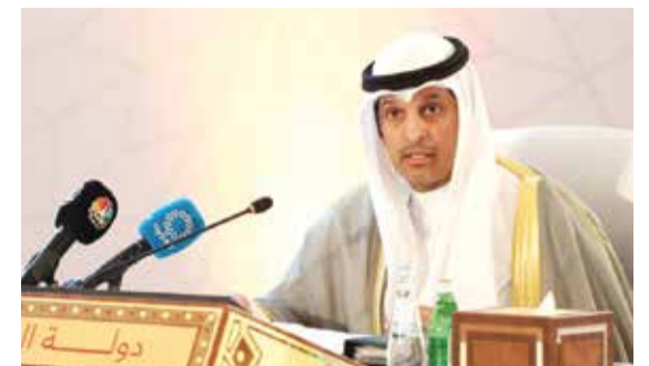
Kuwait's Information Minister Abdulrahman Al-Mutairi

On recent initiatives introduced, the GCC chief mentioned a unified visa scheme within the six-member bloc as among the endeavors aiming to propel the tourism industry to greater levels, saying he expected similar moves to follow suit. Saudi Arabia and Qatar's top tourism