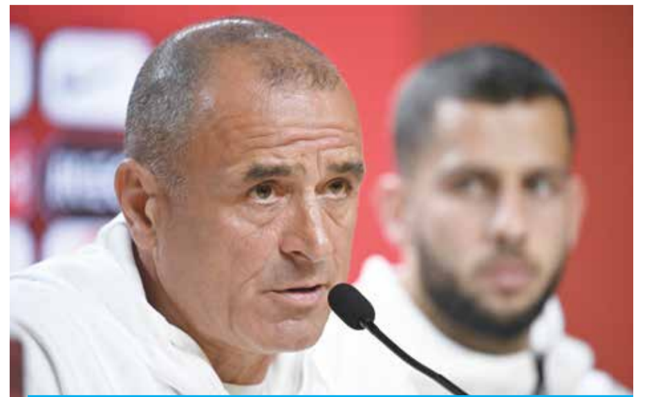
PORTO: (FILES) Slovakia's coach Francesco Calzona gives a press conference ahead of the EURO 2024 first round group A qualifying football match between Portugal and Slovakia at the Dragao stadium in Porto on October 12, 2023. Walter Mazzarri has been sacked by Napoli to become the second man sent packing by the ailing Italian champions this season.

He left in May 2013 after finishing second in Italy's top flight with a thrilling team which boasted Ezequiel Lavezzi, Marek Hamsik and Edinson Cavani in attack. Now Napoli have entrusted a former assistant with salvaging something from this season, a choice which is unlikely to inspire fans who have watched their team crash and burn from the highest of heights.