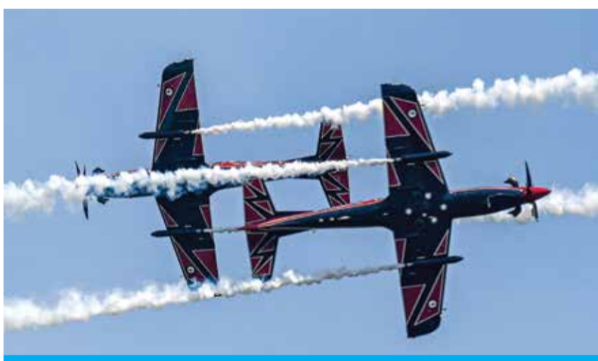
SINGAPORE: Pilatus PC-21 aircraft from the Royal Australian Air Force aerobatic team, also known as the Roulettes, perform during a preview of the Singapore Airshow in Singapore.

The expansion features state-of-the-art meeting rooms, a training center, a theater hall, among other amenities, designed to ensure employees' comfort and well-being while fostering an environment conducive to innovation and productivity.