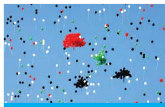
Private schools' students release balloons in the colors of the Kuwaiti flag.