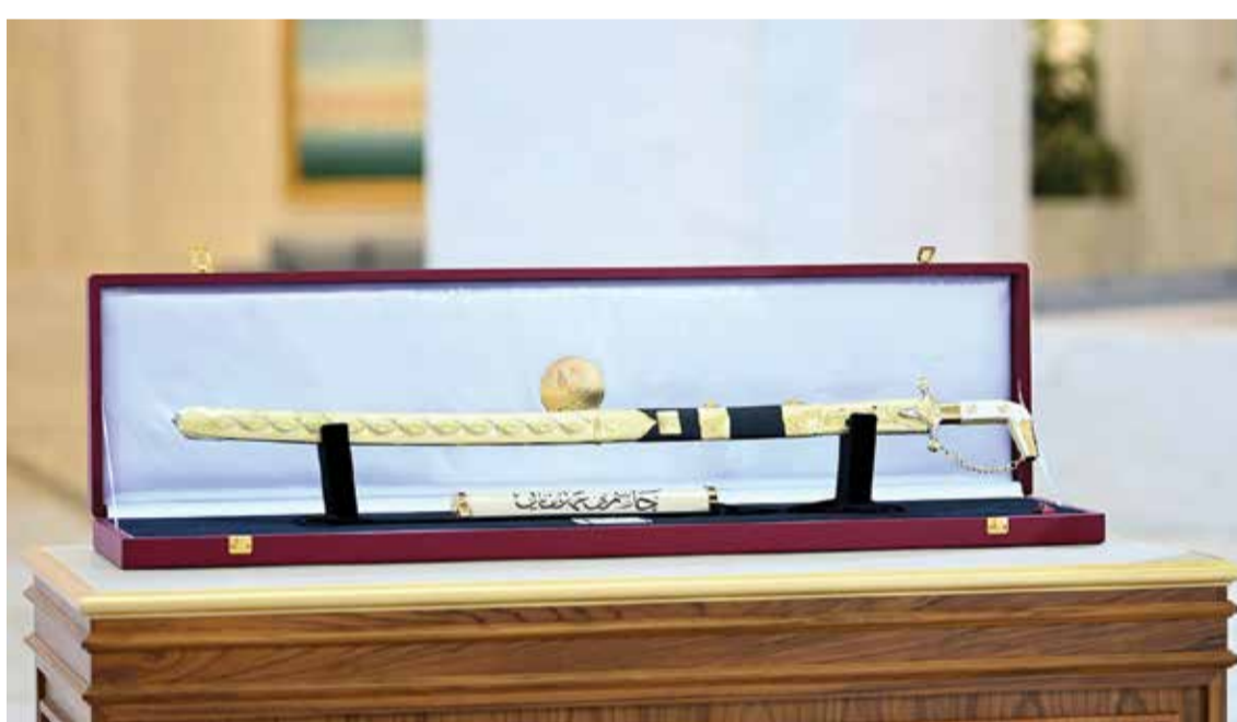
Amir of Qatar Sheikh Tamim bin Hamad Al-Thani presented on Tuesday, the Sword of the Founder Sheikh Jassim bin Mohammad Bin Thani, to His Highness the Amir Sheikh Mishal Al-Ahmad Al-Jaber Al-Sabah as a symbol of the distinguished relations between the two countries.

Regarding the GCC work process, the two sides touched on the outstanding achievements it has achieved in response to the aspirations of the citizens of the GCC countries towards greater interdependence, cooperation, and integration. They