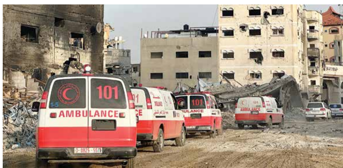
KHAN YUNIS: This handout photograph taken on February 20, 2024 by the World Health Organization (WHO), shows a convoy of ambulances during a mission to evacuate patients from Nasser Hospital. — AFP

"Patients transferred during the missions included three suffering from paralysis — two of them with tracheostomy — and several others with external fixators for severe orthopedic injuries. "Two of the paralyzed patients required continuous manual ventilation throughout the journey, due to the lack of