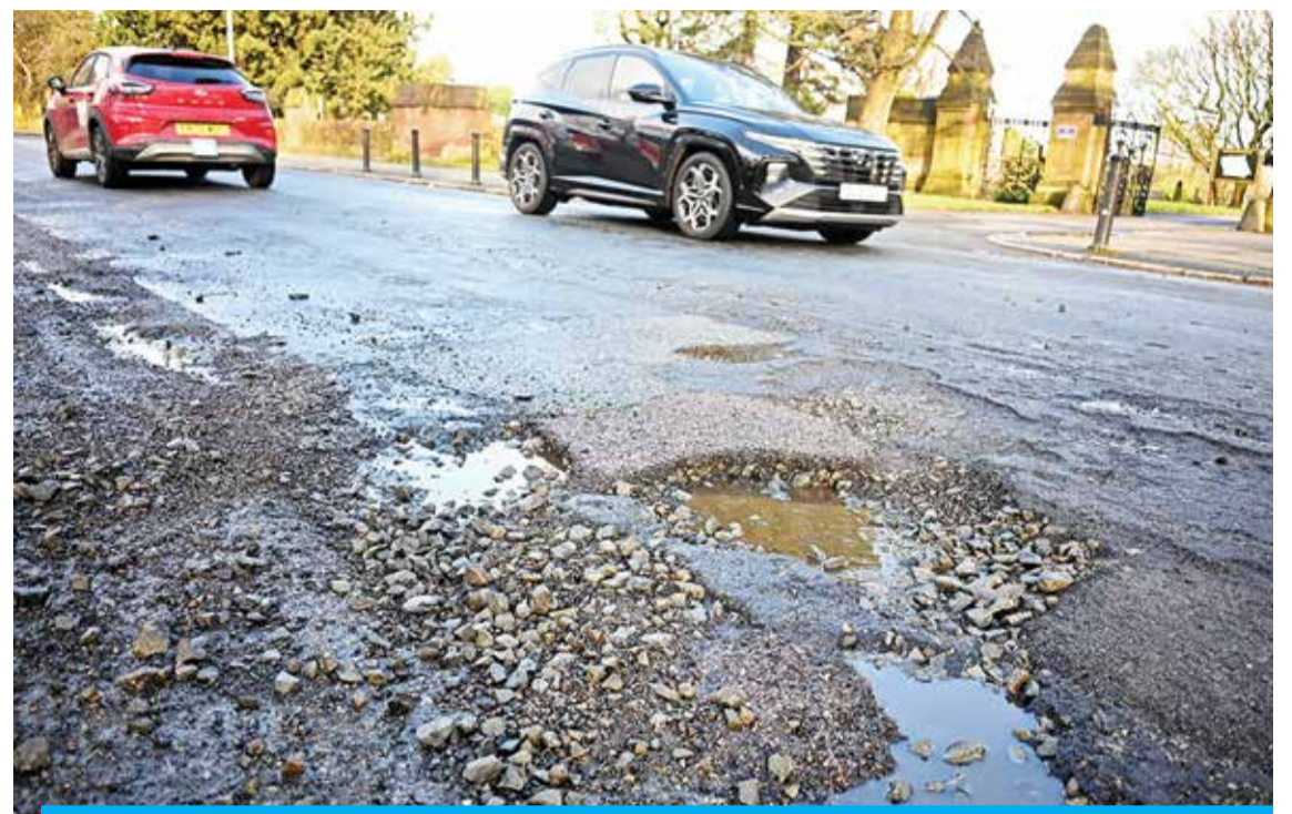
LIVERPOOL: A car is driven past a pothole in a damaged road in Liverpool, north west England on January 30, 2024.

Comedy on the road can be found also in Essex, the county where Stewart carried out his DIY