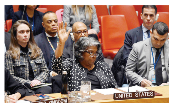
NEW YORK: US Ambassador to the UN Linda Thomas-Greenfield casts a veto vote during a UN Security Council meeting on the Zionist war at UN Headquarters on Feb 20, 2024.

With US President Joe Biden facing increasing pressure to dial down support for the Zionist entity, Washington has put forward an alternative draft resolution on Gaza. That text, seen by AFP, emphasizes "support for a temporary ceasefire in Gaza as soon as practicable" and expresses concern for Rafah.