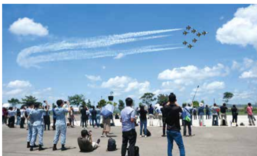
SINGAPORE: Members of South Korea's 'Black Eagle' aerobatics team perform during an aerial display at the Singapore Airshow in Singapore on February 20, 2024.