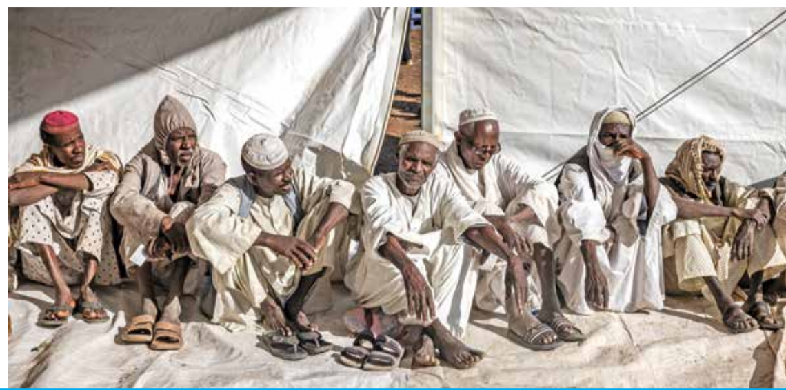
RENK, South Sudan: (Left) A Sudanese woman who has fled from the war in Sudan gets off a truck loaded with aid supplies during a cash assistance programme in Renk. — AFP photos (Right) Sudanese men who have fled from the war in Sudan line up during a cash assistance programme in Renk. — AFP photos