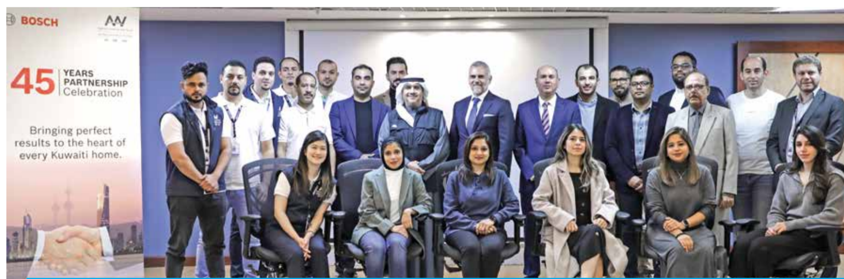
A group photo taken during the celebration.

Gulf Bank is committed to maintaining robust developments in sustainability at environmental, social and governance levels through diverse sustainability initiatives, strategically selected to benefit the Bank both internally and externally. Gulf Bank supports Kuwait Vision 2035 "New Kuwait" and works with various parties to achieve it.