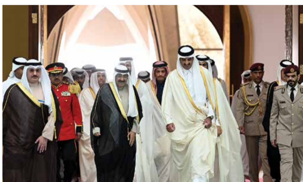
Qatari Amir Sheikh Tamim bin Hamad Al-Thani welcomes His Highness the Amir Sheikh Mishal Al-Ahmad Al-Jaber Al-Sabah.

KUWAIT: A joint statement released on Tuesday after talks between His Highness the Amir Sheikh Mishal Al-Ahmad Al-Jaber Al-Sabah and Qatar's Amir Sheikh Tamim bin Hamad Al-Thani put much emphasis on the "historic bond" shared between the two Gulf Arab neighbors. His Highness the Amir congratulated Sheikh Tamim on Qatar's assumption of the presidency of the 44th session of the Supreme Council of the Cooperation Council for the Arab States of the Gulf.