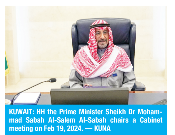
KUWAIT: HH the Prime Minister Sheikh Dr Mohammad Sabah Al-Salem Al-Sabah chairs a Cabinet meeting on Feb 19, 2024.

Dec 16 following the demise of former Amir Sheikh Nawaf Al-Ahmad Al-Jaber Al-Sabah. The decision was taken to prevent the misuse of appointments, especially in senior positions. Almost 80 percent of the Kuwaiti workforce of around 400,000 is employed in the government. Ajmi said the Cabinet was informed of the Amir's decision during its weekly meeting held on Monday night. The Cabinet was also expected to set a date for the upcoming snap polls to be held after HH the Amir dissolved the National Assembly on Feb 15 over remarks made by some MPs that were deemed offensive to the ruler. But the Cabinet made no announcement of the election date, which must be within two months of dissolving the Assembly, according to the constitution.