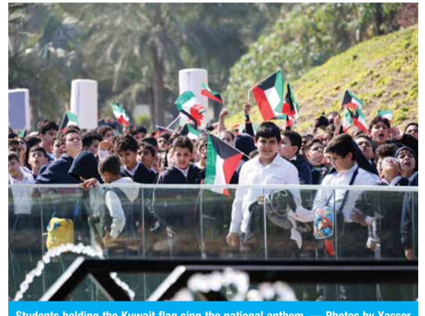
Students holding the Kuwait flag sing the national anthem.