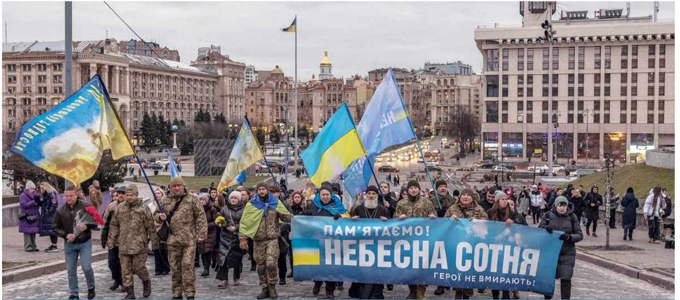
KYIV: People and activists take part in a march in memory of the Maidan activists, referring to the people killed during the anti-government demonstration of 2014, in downtown Kyiv on February 18, 2024.