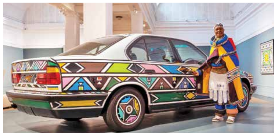
Artist Esther Mahlangu in front of her BMW Art Car at Iziko South African National Gallery, 2024.