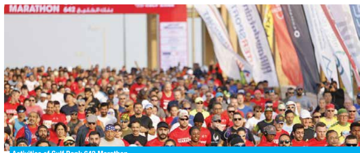
Activities of Gulf Bank 642 Marathon.