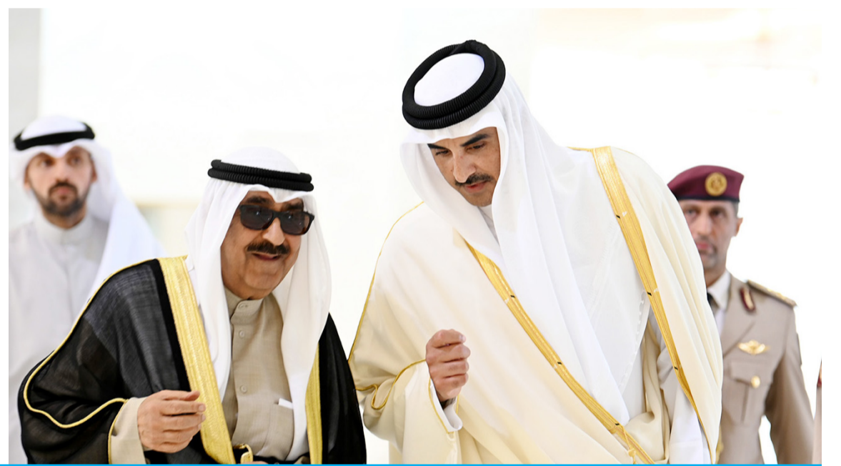
DOHA: Qatari Amir Sheikh Tamim bin Hamad Al-Thani presents the Sword of the Founder Sheikh Jassim bin Mohammad bin Thani to HH the Amir Sheikh Mishal Al-Ahmad Al-Jaber Al-Sabah during his state visit to Qatar on Feb 20, 2024.

DOHA: HH the Amir Sheikh Mishal Al-Ahmad Al-Jaber Al-Sabah, accompanied by senior officials, arrived in the Qatari capital on Tuesday on a state visit to the Gulf country. Upon entering Qatari territorial airspace, a squadron of Qatari warplanes accompanied HH the Amir's plane until its landing at the airport, where he was welcomed by the Qatari Amir Sheikh Tamim bin Hamad Al-Thani and senior officials. An official reception was held for HH the Amir Sheikh Mishal at the Qatari Amiri Diwan on the oc-