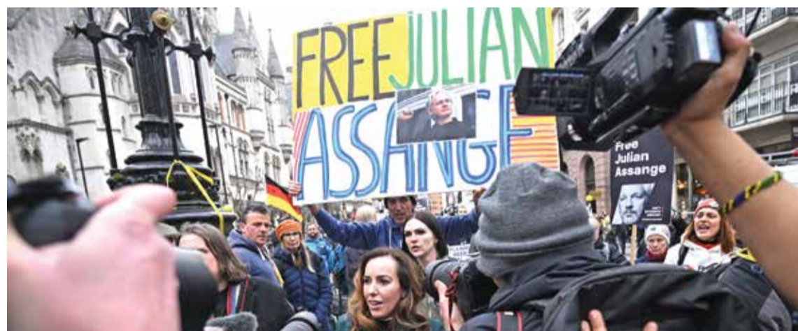
LONDON: Wife of WikiLeaks founder Julian Assange, Stella Assange (center) is surrounded by supporters as she leaves Britain's High Court during a break in proceedings.

"Some weeks we have seen ourselves completely overwhelmed," he told AFP, adding that the approaching monsoon made him nervous. "We are truly afraid of what will happen when the rainy season comes, with waters rising from the river and disrupting the normal functioning of the port." With up to 10 trucks and buses turning up in Renk every day, the UN is trying to mobilize the international community, launching an appeal for $4.1 billion this month to respond to the most urgent humanitarian needs.