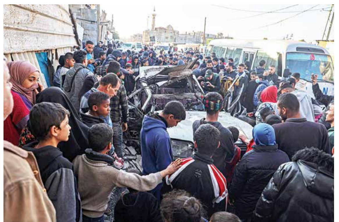
GAZA: Onlookers gather around a car that was destroyed in a Zionist raid in Rafah in the southern Gaza Strip on Feb 20, 2024.

The Zionist entity is not participating in the oral hearings but sent a written contribution in which it described the questions the court had been asked as "prejudicial" and "tendentious". Zionist Prime Minister Benjamin Netanyahu's office said in a statement that the conflict should be resolved through negotiations.