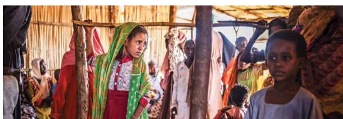
A Sudanese girl who has fled from the war in Sudan with her family stands after crossing the border while waiting to be registered by the authorities at the Joda Border Crossing Point, near Renk.

While many in Renk long to return home, others hope to travel onwards to the town of Malakal in Upper Nile state, which is also hosting a huge number of refugees. At Renk port, hundreds of people lined up under the oppressive glare of the midday sun, waiting hours to hop aboard the metal