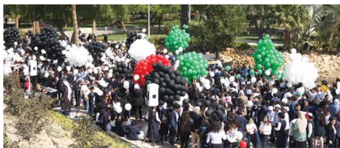
Private schools' students meet at Al Shaheed Park, Phase 01.