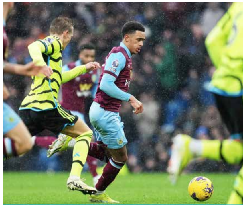
LONDON: (FILES) Burnley's English midfielder #21 Aaron Ramsey (C) vies with Arsenal's Norwegian midfielder #8 Martin Odegaard (2L) during the English Premier League football match between Burnley and Arsenal at Turf Moor in Burnley.

"But within the last few games, we've been brilliant in front of goal.