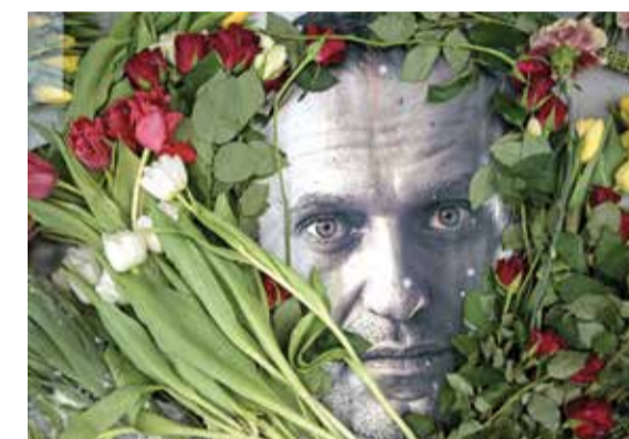
FRANKFURT: Flowers are seen placed around a portrait of Alexei Navalny at a makeshift memorial in front of the former Russian consulate in Frankfurt.