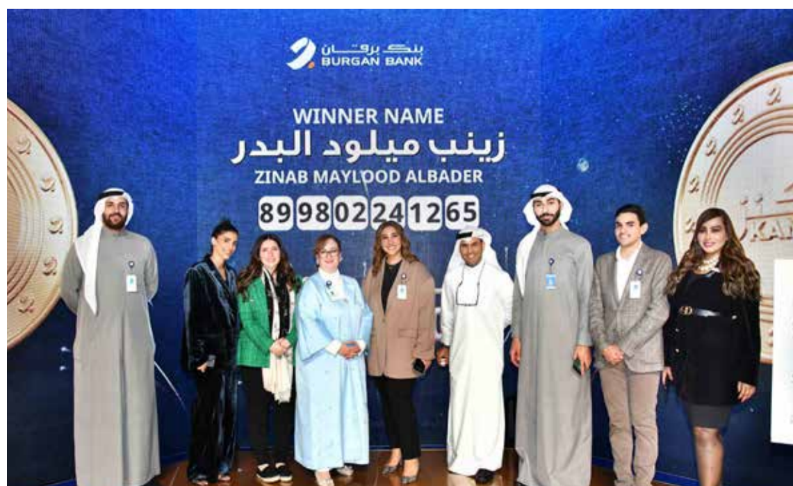
The Burgan Bank team during the ceremony.