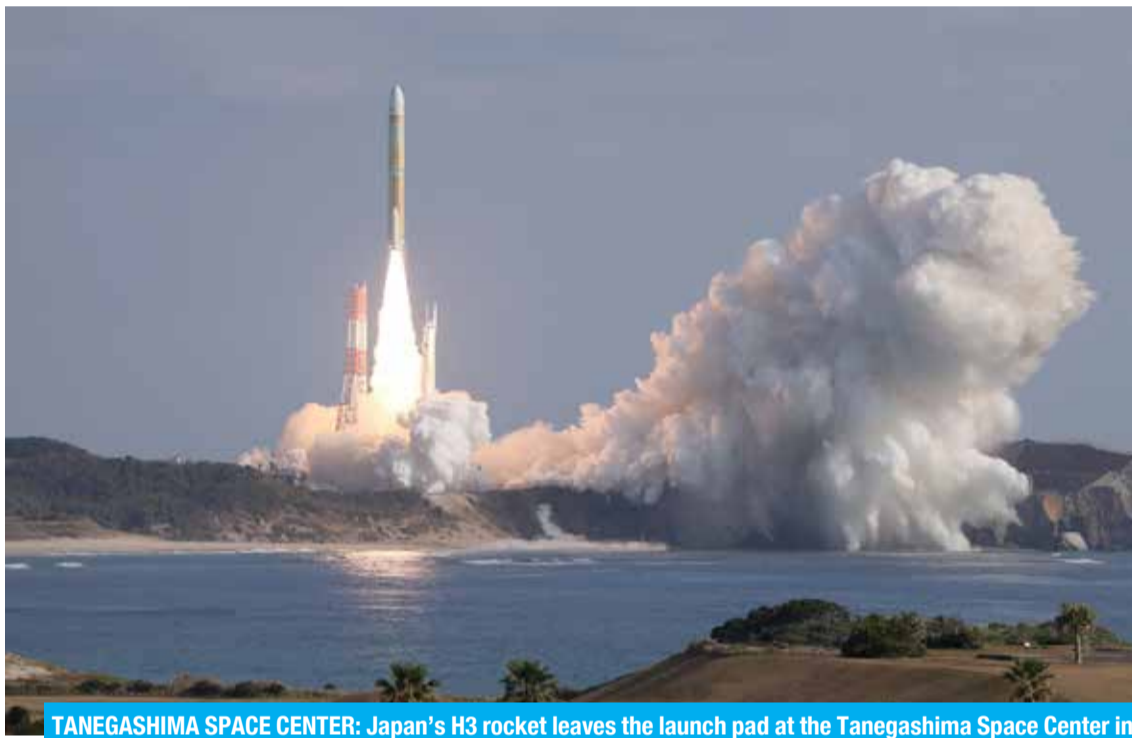
TANEGASHIMA SPACE CENTER: Japan’s H3 rocket leaves the launch pad at the Tanegashima Space Center in Kagoshima, southwestern Japan on February 17, 2024.

The H3 “has the potential to be the most cost-effective rocket”, making the exploration of the solar system more affordable. Its maiden launch has been beset by mishaps. A February 2023 launch was abandoned after ignition issues left the rocket standing motionless on the ground. On the second try in March last year, technical problems meant a