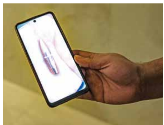
A nurse shows his cellphone with a picture of a bullet found at the hospital.