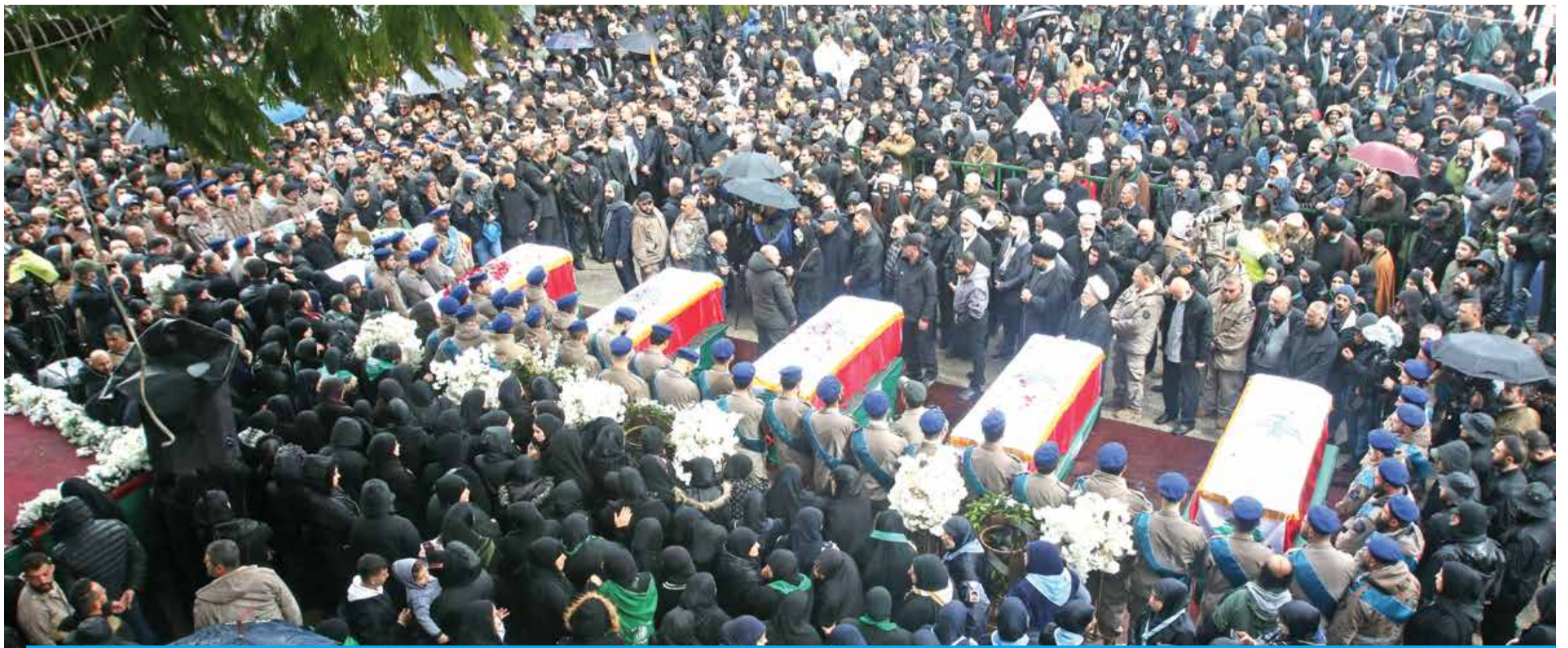
NABATIYEH: Mourners, Hezbollah militants and clerics gather around the flag-draped coffins of civilians killed in a Zionist strike on February 14, during their funeral, on February 17, 2024.