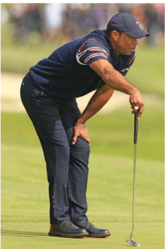
CALIFORNIA: Tiger Woods of the United States reacts to his putt on the second green during the second round of The Genesis Invitational at Riviera Country Club on February 16, 2024.— AFP

In reply, the hosts racked up a massive 575-9 before declaring with the highest total by a women's Test side. The ominous score was spearheaded by an imperious 210 from 22-year-old Sutherland - the fourth biggest women's score in Test cricket and at 248 balls the fastest double century. South Africa put up stiffer resistance in their second innings with Delmi Tucker and Chloe Tryon both hitting 64, before the tail folded and they were out for 215 on day three. Brown took 2-47 to claim seven for the game while player-of-the-match Sutherland picked up another two.— AFP