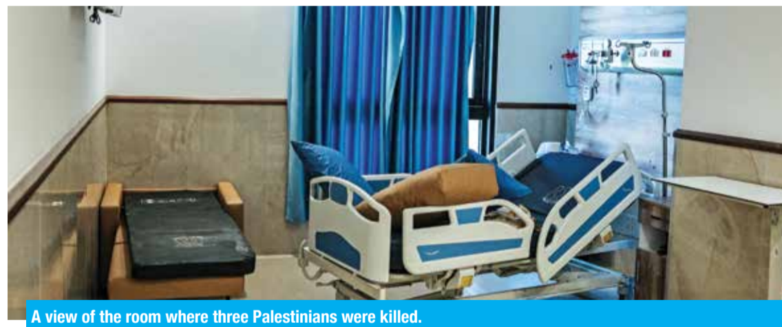
A view of the room where three Palestinians were killed.