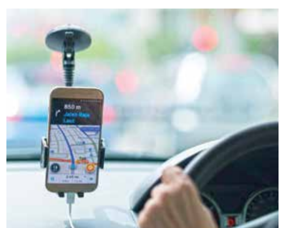
BRUSSELS: France and Germany on Friday refused to back controversial EU rules covering app workers in the gig economy.

They also want Eni to be obliged to make a "declaration of responsibility" over damage caused by its greenhouse gas emissions, which they say are globally greater than those generated by the whole of Italy. Eni said Friday it "will prove in the legal proceedings the groundlessness of Greenpeace and ReCommon's claims, both legally and factually."