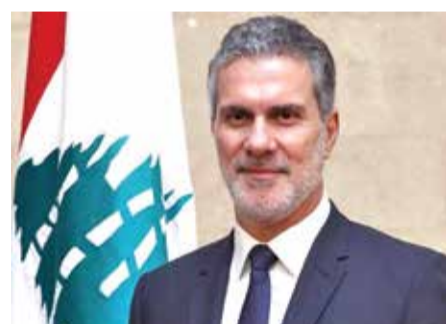
Lebanese Minister of Tourism, Waleed Nassar.

gional conditions affecting the country, commenting that despite such conditions the ski season kicked off with satisfactory turnout. He mentioned that the Ministry working on readying popular ski sites to promote Lebanon as the