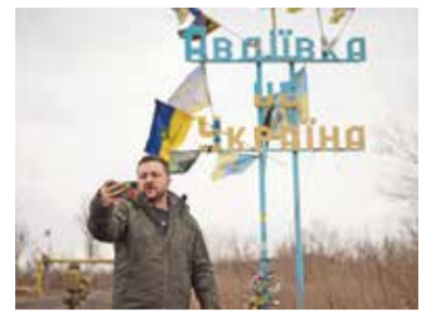
Ukraine withdraws from key city