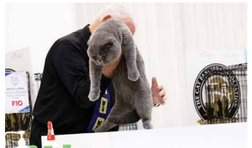
KUWAIT: Cats participate in a show organized by the Kuwait Cat Club in Salmiya on February 17, 2024.