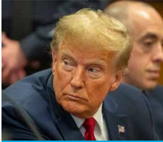
NEW YORK: Donald Trump attends a pre-trial hearing at Manhattan Criminal Court on February 15, 2024.