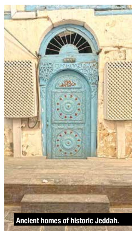
Ancient homes of historic Jeddah.

Historic Jeddah, known as Al-Balad, was built on a beautiful coastal land, where ancient homes were transformed using the latest technologies and expertise into art galleries, gathering people from different cultures. Al-Balad's authentic architectural style with 'Al-Rawashin balcony' hanging overhead on every building, was listed on UN Educational, Scientific and Cultural Organization (UNESCO) World Heritage site in 2014. Al-Balad unveils a human heritage with eight gates, each is known for its historical stories, in addition to various ancient houses praised for their distinctive designs and the names of their families. —KUNA