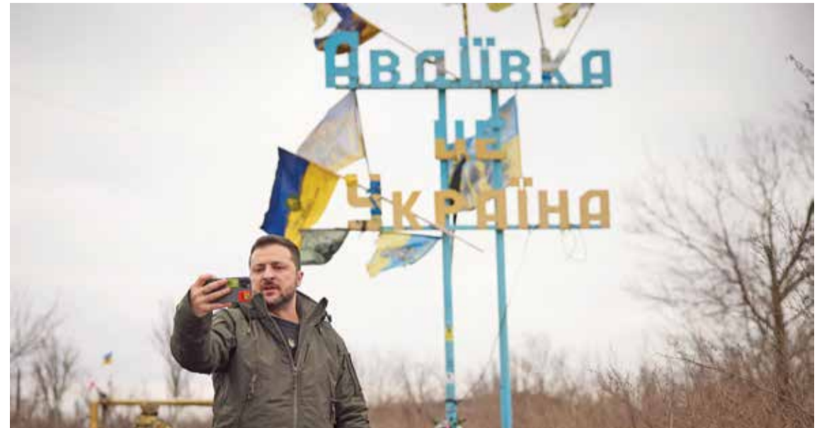
AVDIIVKA: This handout photo by Ukrainian Presidential Press Service shows President Volodymyr Zelensky recording a video address in front of a sign reading "Avdiivka is Ukraine" on December 29, 2023.

He said this applied not only to the Gaza Strip but also to work in the West Bank, Syria, Jordan and Lebanon. Lazzarini said he was holding meetings with donors and some were "willing to reconsider their decision". He said the European Commission would pay its contribution of around 82 million euros ($88 million) again from March.