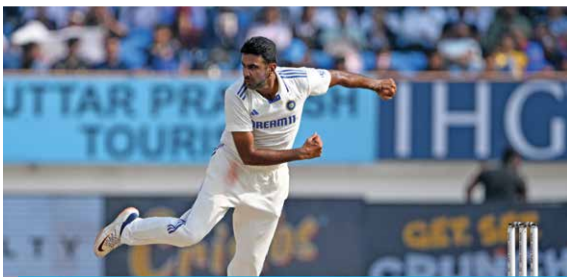
RAJKOT: India's Ravichandran Ashwin delivers a ball during the second day of the third Test cricket match between India and England at Niranjan Shah stadium on February 16, 2024.

"My poor motor skills did not allow me to get off the pitch in time," said Ashwin. India now remain a bowler short with England racing along at 207-2 at close of play after Ben Duckett, 133 not out, slammed a century in 88 balls. India are already without Virat Kohli, who missed the series due to "personal reasons" and KL Rahul, forced out injured in the second and third match. The five-Test series remains level at 1-1 after England won the opener and India bounced back in the second match.— AFP