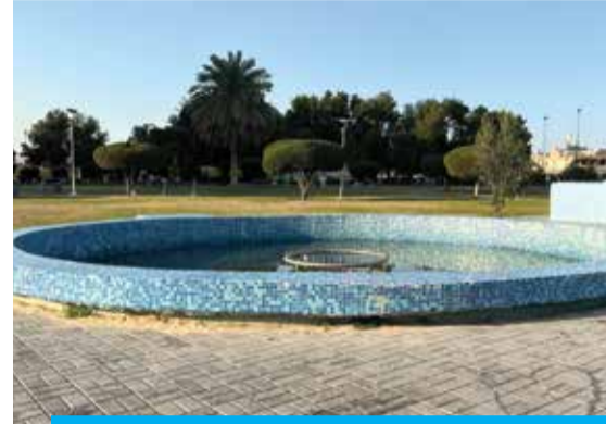
The current water fountain area (left) — the vision that Dousari aims to implement (right).