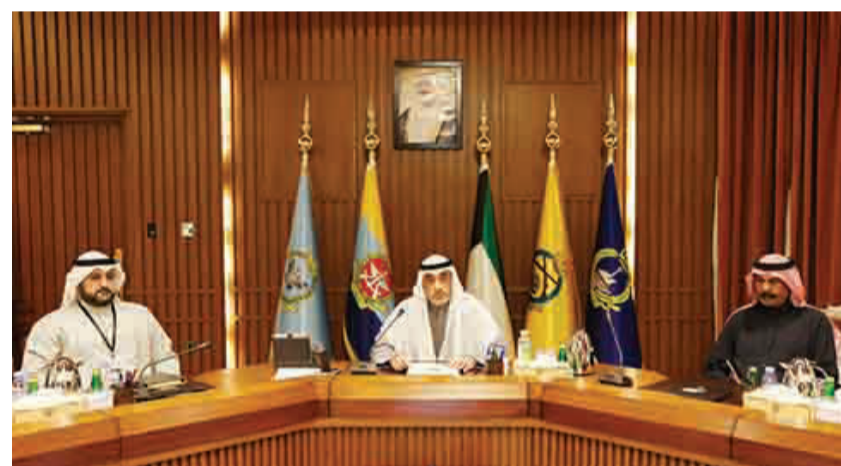
KUWAIT: Deputy Prime Minister, Defense Minister and Acting Interior Minister Sheikh Fahad Al-Yousef Al-Sabah holds a meeting at the defense ministry on Feb 17, 2024. — KUNA

BEIRUT: Hezbollah chief Hassan Nasrallah vowed Friday that the Zionist will pay "with blood" for civilians it killed in Lebanon this week, warning the group has missiles that can reach anywhere in the Zionist entity. The funeral of the seven family members killed in Nabatiyeh was held on Saturday. — AFP (See Page 5)