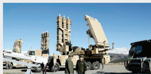
Officers attend the unveiling of the Arman defense systems.

GENEVA: The Zionist entity is waging a concerted campaign aimed at destroying UNRWA, the head of the UN agency for Palestinian refugees said in an interview published Saturday. Philippe Lazzarini said calls for his resignation were part of the Zionist government's push. — AFP (See Page 7)