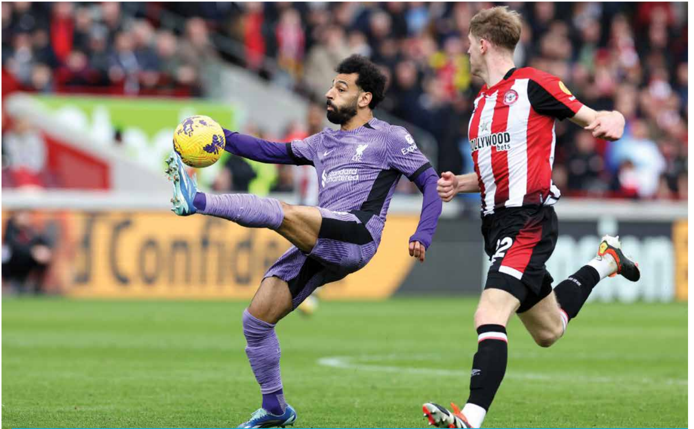
LONDON: Liverpool's Egyptian striker #11 Mohamed Salah controls the ball during the English Premier League football match between Brentford and Liverpool on February 17, 2024.

LONDON: Mohamed Salah returned in style with a goal in Liverpool's 4-1 rout of Brentford as the Premier League leaders survived a rash of injuries to step up their title charge on Saturday. Salah came off the bench to replace the injured Diogo Jota in his first Liverpool appearance since their win over Newcastle on New Year's Day. Having returned from the hamstring injury he sustained on Egypt duty at the Africa Cup of Nations, Salah made up for lost time with his first goal for the Reds since the Newcastle game.