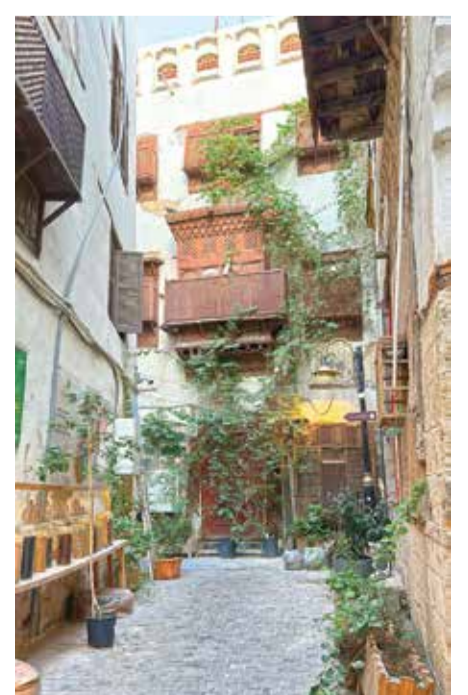
The city was listed on (UNESCO) World Heritage sites in 2014.

Authentic architectural style with 'Al-Rawashin' balcony.