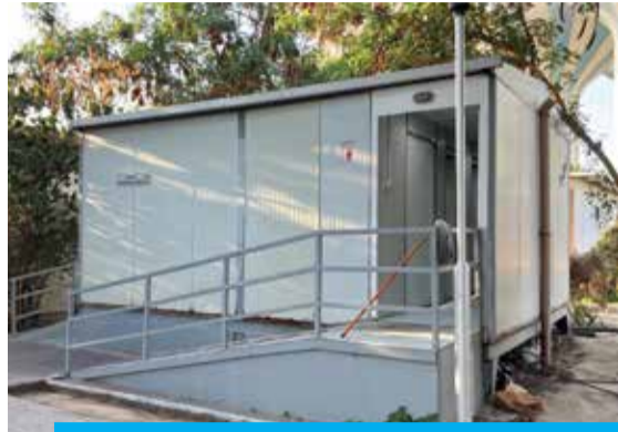
The current restroom design (left) — Dousari aims to redesign the restroom to this (right).

Ambitious student project named 'Rethinking Aladailiya' seeks to revamp one of the oldest parks