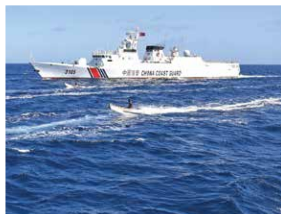
Filipino fishermen aboard their wooden boats sailing past a Chinese coast guard ship near the China-controlled Scarborough Shoal, in disputed waters of the South China Sea, on February 16, 2024. — AFP

Salvador Achina, 49, said the food and fuel deliveries were a "big help", enabling the fishermen to go further out to sea. BFAR spokesman Nazario Briguera said more than 385,000 Filipino fishermen depended on the waters to the west of the country for their livelihoods. Scarborough Shoal is 240 kilometers (150 miles) west of the Philippines' main island of Luzon and nearly 900 kilometers from the nearest major Chinese land mass of Hainan. — AFP