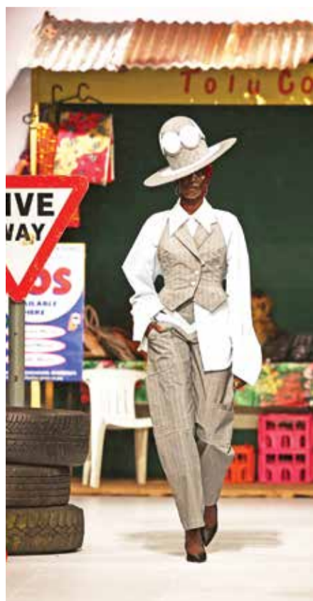
Models present creations by British-Nigerian designer Tolu Coker during a catwalk presentation for her Autumn/Winter 2024 collection during London Fashion Week in London.