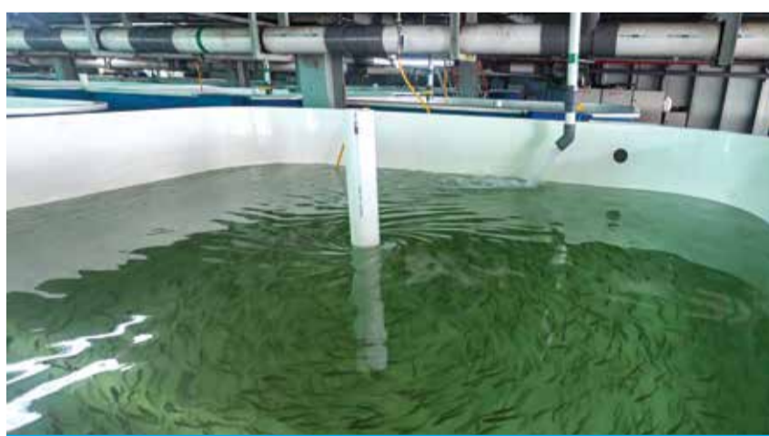
SINGAPORE: Fish in a tank at the Aquaculture Centre of Excellence (ACE) Farm Eco Ark fish farm in Singapore.