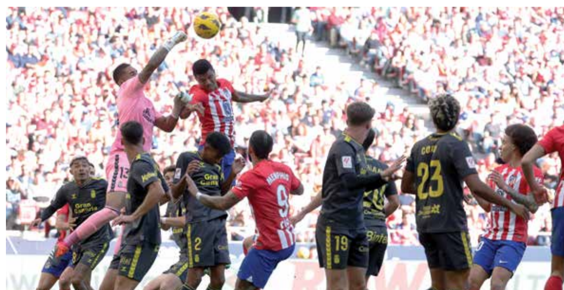
MADRID: Las Palmas' Spanish goalkeeper #13 Alvaro Valles (top left) clears the ball as Atletico Madrid's Mozambican defender #23 Reinildo Mandava jumps for a header during the Spanish league football match on February 17, 2024.

Depay wrapped up the win after he was sent through, firing home with aplomb to complete the