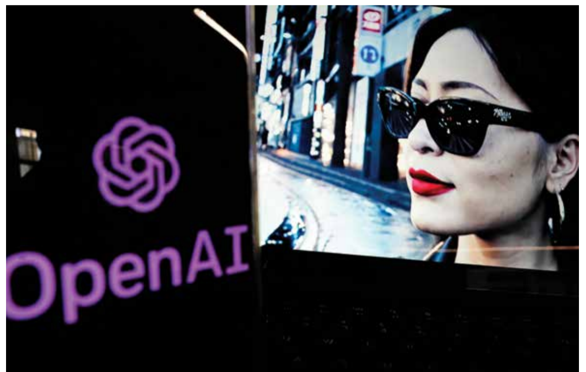
WASHINGTON: In this photo illustration, a video created by Open AI's newly released text-to-video "Sora" tool plays on a monitor in Washington, DC on Feb 16, 2024.

However, the "positive atmosphere has to be