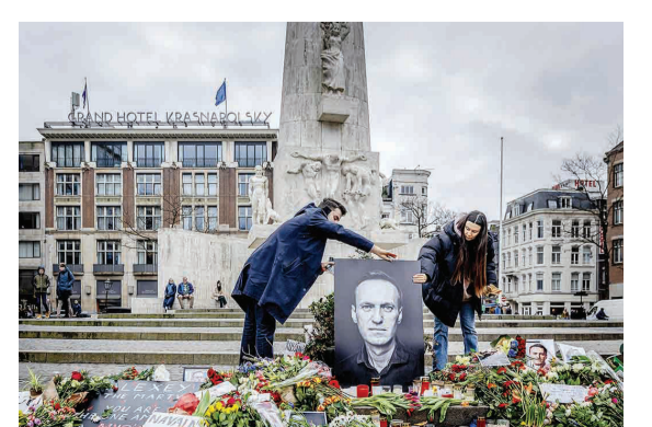
AMSTERDAM: People set up a portrait of Alexei Navalny on Dam Square on Feb 17, 2024, one day after Russian officials announced the death of the Kremlin's most prominent critic.