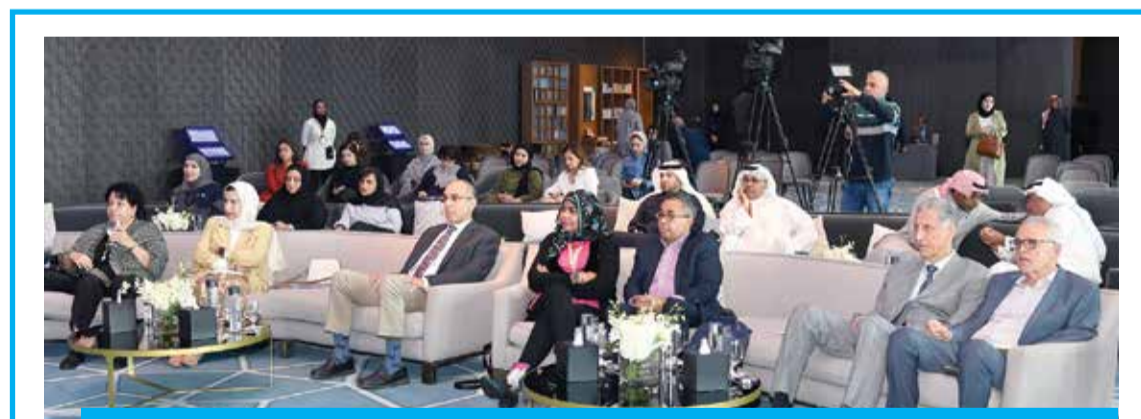
KUWAIT: Participants attend a seminar as part of the 29th Qurain Cultural Festival.