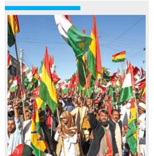
QUETTA, Pakistan: Supporters of Balochistan National Party, Pashtunkhwa Milli Awami Party and Hazara Democratic Party protest against the alleged skewing in Pakistan's national election results on February 17, 2024.