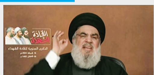
Hezbollah chief Hassan Nasrallah delivers televised speech.