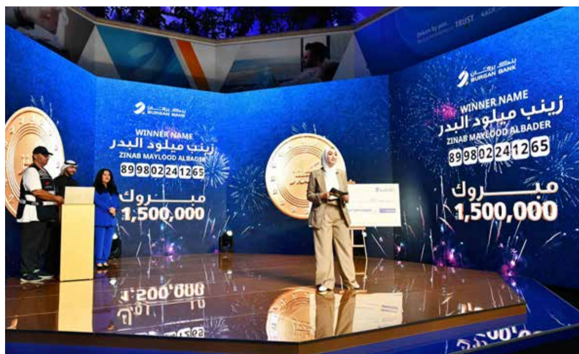
The announcement of the winner.

In these times of ever-evolving financial needs, especially the need for achieving financial stability, banking safety, and guaranteed returns, Burgan Bank continues to tune its digital banking innovations to serve its customers' constant and changing aspirations and offer seamless solutions to their everyday needs – with Kanz serving as one prominent example of the Burgan's efforts to enable its customers to fulfill their banking needs with ease and efficiency. With a vision to become the most modern and progressive bank in Kuwait, Burgan Bank continues to adopt the latest financial technologies to provide an unparalleled banking experience that is delivered through a wide range of progressive digital solutions, allowing its customers to lead a lifestyle of more convenience and control over their financials.