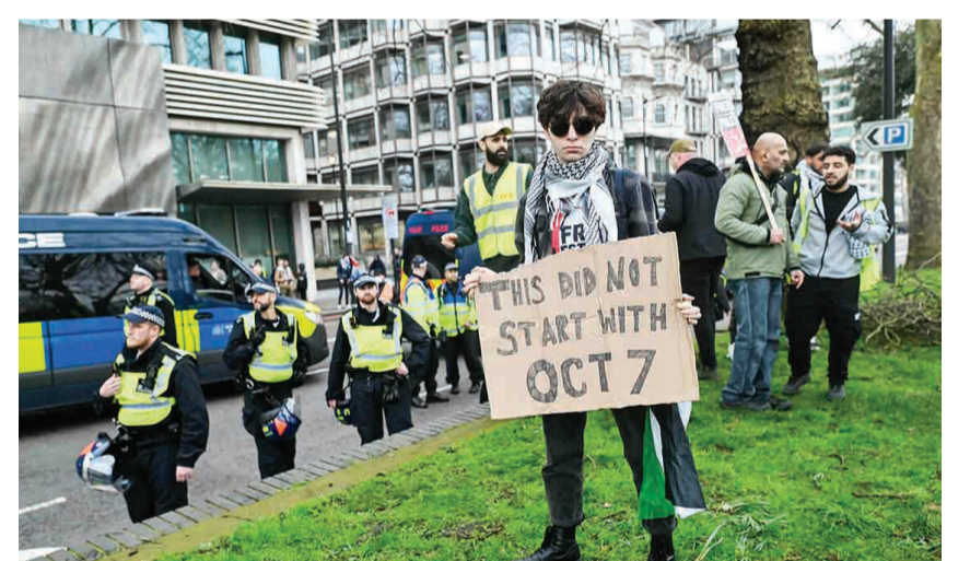
LONDON: A pro-Palestinian supporter poses with a placard during the National March for Palestine on Feb 17, 2024