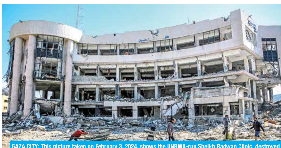
GAZA CITY: This picture taken on February 3, 2024, shows the UNRWA-run Sheikh Radwan Clinic, destroyed during Zionist bombardment on Gaza City.