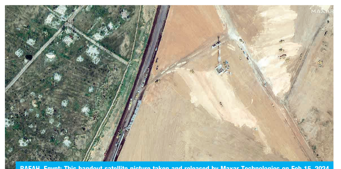
RAFAH, Egypt: This handout satellite picture taken and released by Maxar Technologies on Feb 15, 2024 shows machinery building a wall along the Egypt-Gaza Strip border.

His death, which the West has blamed on the