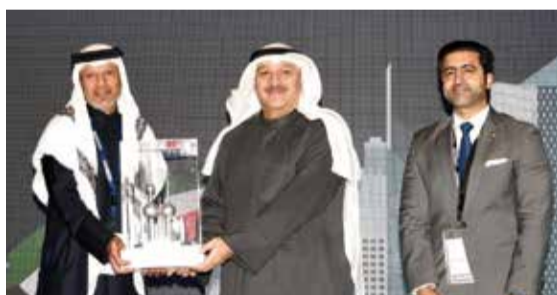
KUWAIT: Kuwait Health Minister Dr Ahmad Al-Awadhi attends the 23rd Ophthalmology Conference organized by the Ophthalmology Departments Council.

Dr Awadhi underscored the ministry's commitment to supporting medical conferences in various specialties, and he expressed the ministry's dedi-