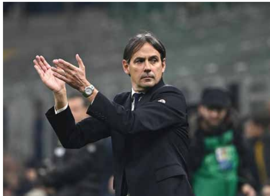
Inter Milan's Italian coach Simone Inzaghi

Salernitana didn't have single shot on target as Inter hemmed them in from the first whistle, the manner of victory so comprehensive that Inzaghi had the luxury of substituting his star players with half an hour remaining. And the night was complete when Arnautovic, who has struggled since signing for Inter in the summer, tapped in Dumfries' deflected low cross in the final minute. Inter now turn their attentions to Tuesday's clash at the San Siro as they try to repeat last season's run to the Champions League final. — AFP