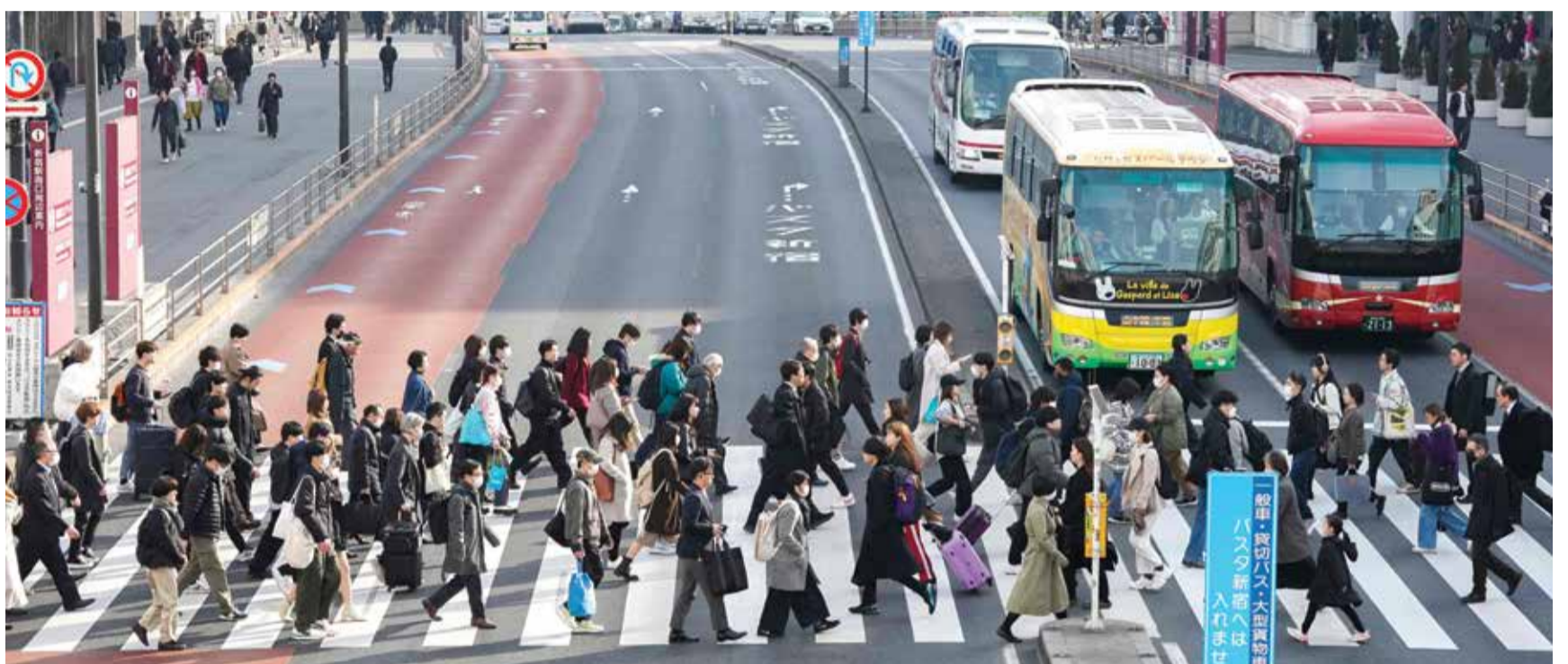
TOKYO: People commuting to work in the morning cross a pedestrian crossing in Tokyo on February 15, 2024.

But with more visitors than ever flocking to Japan, and the country's pop culture booming in popularity, onigiri are now also becoming a lunch option overseas. Japanese rice ball chain Omusubi