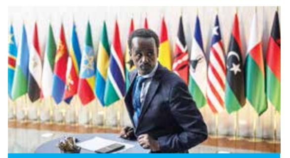
ADDIS ABABA: A man takes notes at a table in front of the flags of the member states of the African Union at the AU headquarters in Addis Ababa on February 15, 2024.

The organization has so far had "very little influence