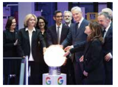
Google boosts Paris' ambition to become Europe's AI epicenter