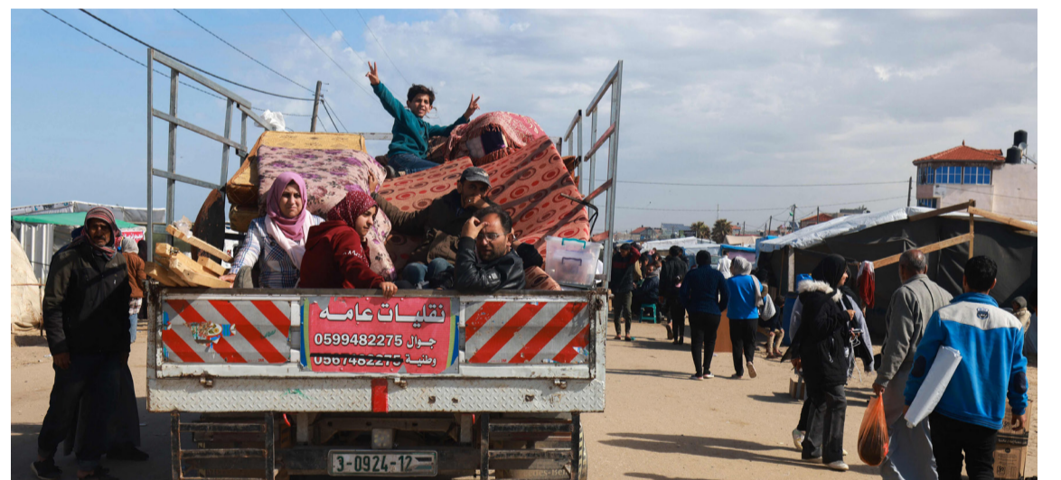
GAZA: A boy flashes the victory sign as Palestinians flee from Rafah in the southern Gaza Strip to what they believe are safer areas in central Gaza on Feb 15, 2024.