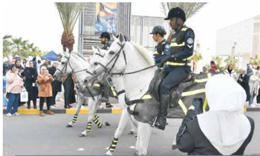
KUWAIT: Kuwait University held an event to celebrate the 63rd anniversary of the National Day and the 33rd Liberation Day at the University City of Sabah Al-Salem.

KUWAIT: The International Diplomatic Club Kuwait, in partnership with the Kuwait Red Crescent Society, is honored to invite people to attend AlJoud Bazaar, an international charity bazaar to benefit the children of Gaza. The bazaar will see the participation of a significant number of Arab and foreign embassies accredited to the State of Kuwait, in addition to a selection of leading Kuwaiti companies. Al-Joud Bazaar will be held on Monday, February 19, 2024, at The Crowne Plaza Hotel - AlBaraka Ballroom from 10 am to 8 pm.