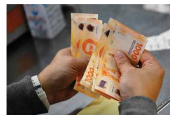
BUENOS AIRES: A man counts one thousand Argentine peso banknotes in Buenos Aires.

But in a symbol of support for Milei's reforms, the IMF in late January issued a fresh disbursement of $4.7 billion in funds, as part of a previously agreed