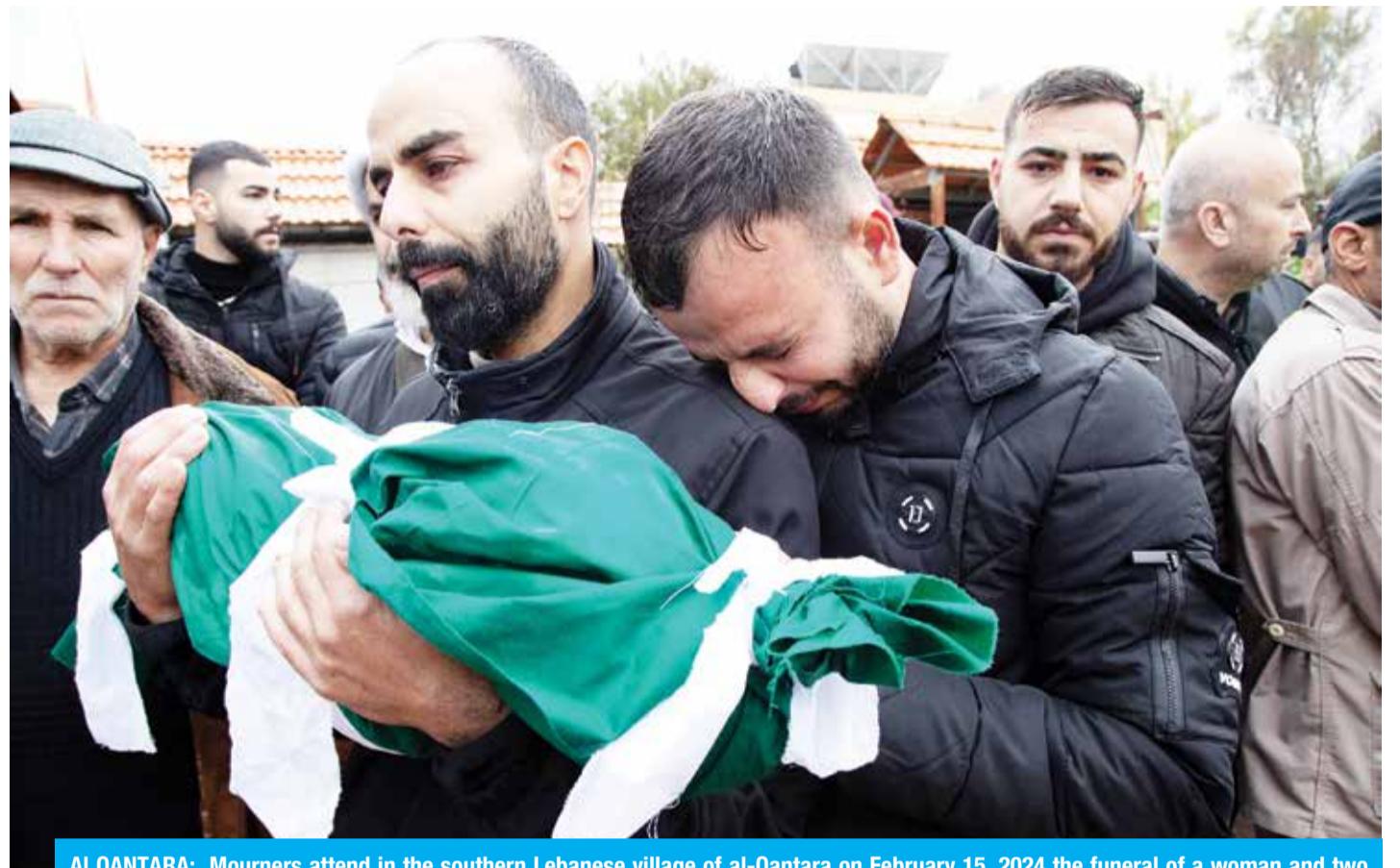
AI QANTARA: Mourners attend in the southern Lebanese village of al-Qantara on February 15, 2024 the funeral of a woman and two children killed yesterday during a Zionist air strike in the village of Al-Sawwaneh.