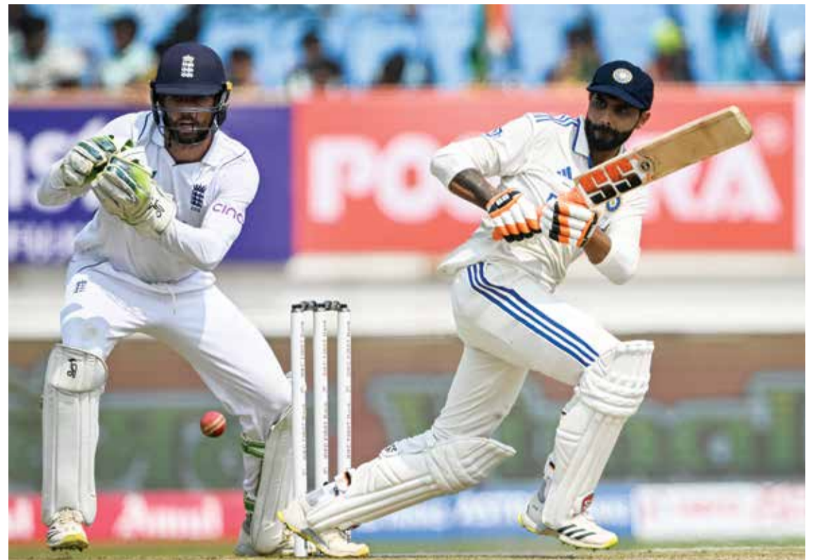
RAJKOT: India's Ravindra Jadeja (right) plays a shot during the first day of the third Test cricket match between India and England at Niranjan Shah stadium in Rajkot on February 15, 2024.

"It was a hard-fought day and we will see tomorrow. Hopefully take some wickets in the morning." Spin was introduced after eight overs and Hartley struck with his left-arm spin to send back Rajat Patidar for five. Rohit survived a hit on the helmet early on in the innings and Root dropped the opener at slips on 27. He was also given out lbw to James Anderson, who needs five more dismissals to reach 700 Test wickets, but successfully reviewed, with replays showing a faint edge.