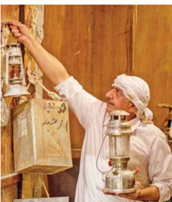
A man holds an old gas lantern. — All photos from the troupe’s shows

essence of the country in all the little details of their shows will know that this group of people isn’t just working to keep themselves busy, but is genuinely aiming to leave an unforgettable message for the world, promoting the values of unconditional love and loyalty towards Kuwait.