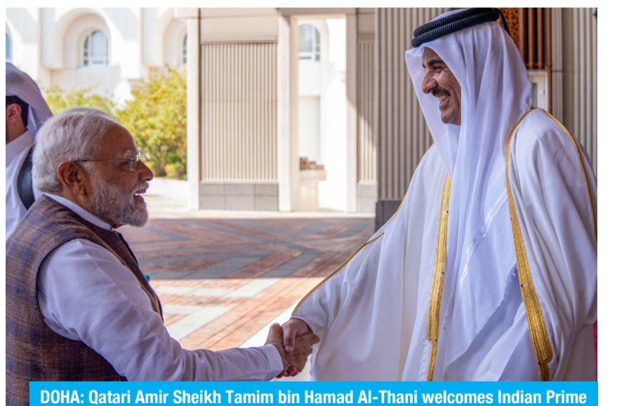
DOHA: Qatari Amir Sheikh Tamim bin Hamad Al-Thani welcomes Indian Prime Minister Narendra Modi during an official ceremony on Feb 15, 2024.