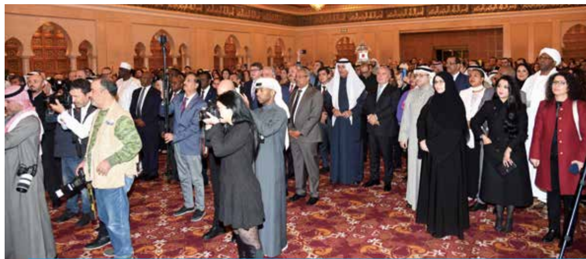
Guests attending the event.

Lastly, he added the significant interest by