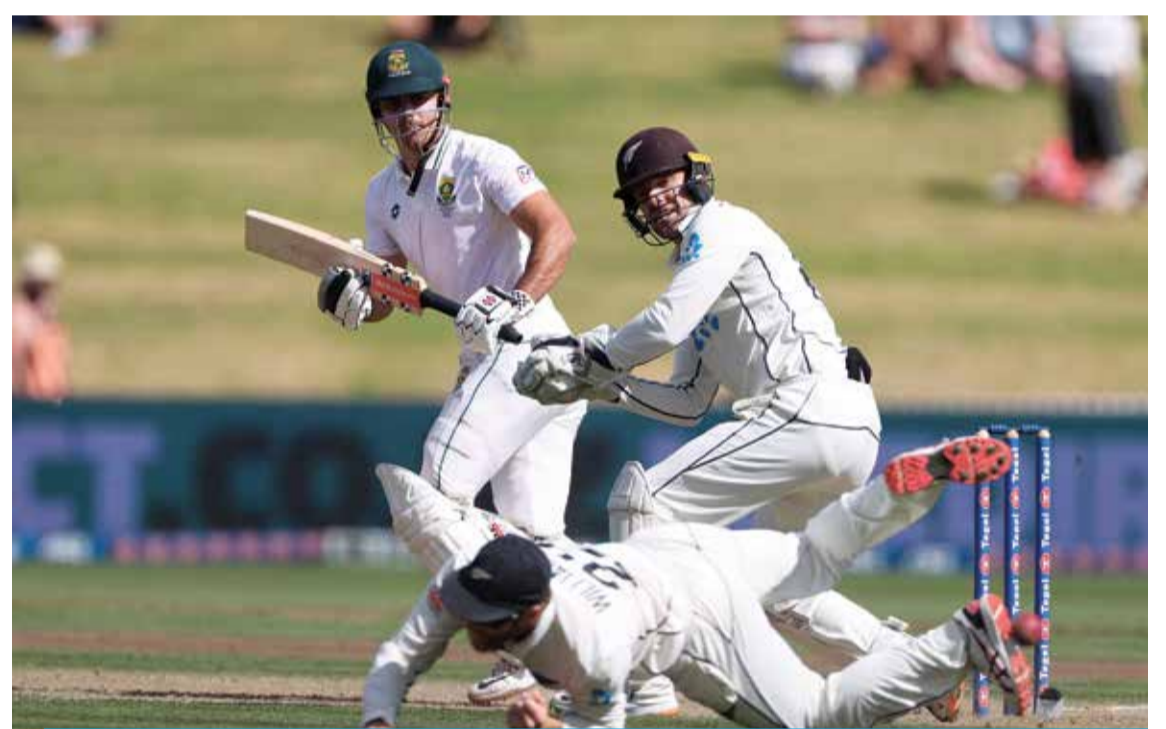
HAMILTON: South Africa's David Bedingham (left) runs as New Zealand's Kane Williamson (center) misses the ball as wicket keeper Tom Blundell looks on during day three of the second cricket test match between New Zealand and South Africa at Seddon Park in Hamilton on February 15, 2024.