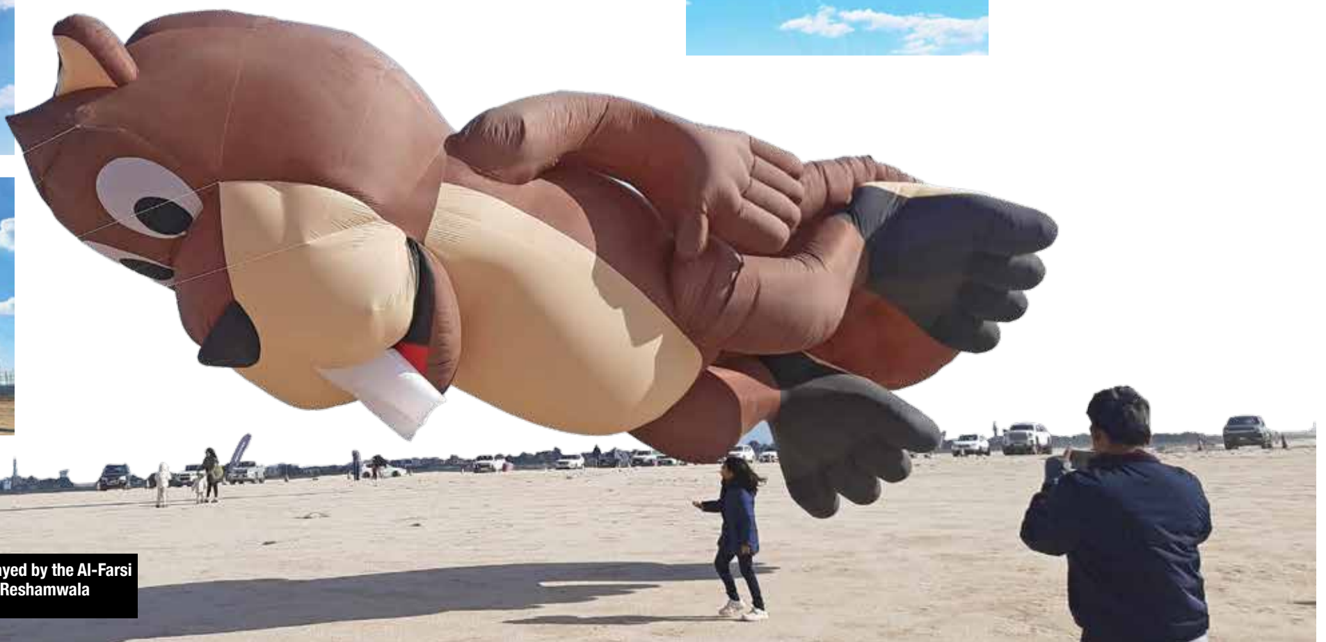
Visitors are dwarfed by giant kites displayed by the Al-Farsi Kite Team in Bneidar.