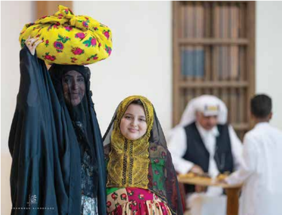
A woman carrying a bundle on her head is seen with a girl wearing traditional Kuwaiti dress.