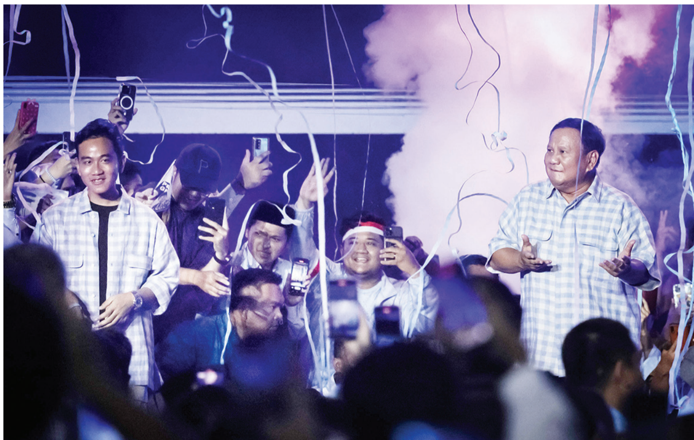
JAKARTA: Presidential candidate and Indonesia's Defence Minister Prabowo Subianto (R) dances on the stage with vice presidential candidate Gibran Rakabuming Raka (L), Indonesian President Joko Widodo's son and current Surakarta City mayor, during their gathering with supporters after polls closed in the country's presidential and legislative elections in Jakarta.

Some of Indonesia's allies have so far avoided congratulating the fiery populist on his apparent victory, with the official announcement still weeks