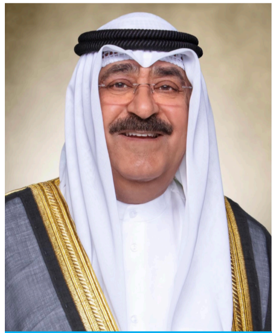
HH the Amir Sheikh Mishal Al-Ahmad Al-Jaber Al-Sabah

Decree accuses parliament of constitutional violations, including using offensive language