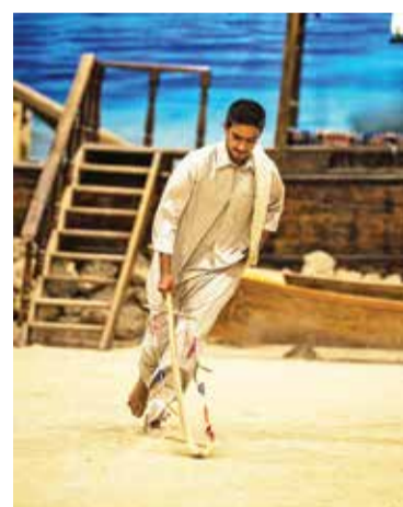
A boy playing with al kavood, a toy made from palm trunk.

She highlights the main goals of the troupe are to leave a real impact on future generations by helping them stay more