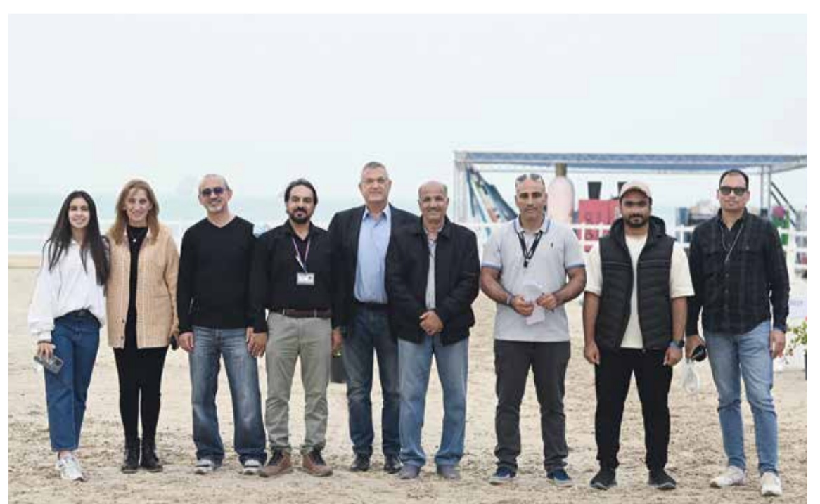
The judging committee.