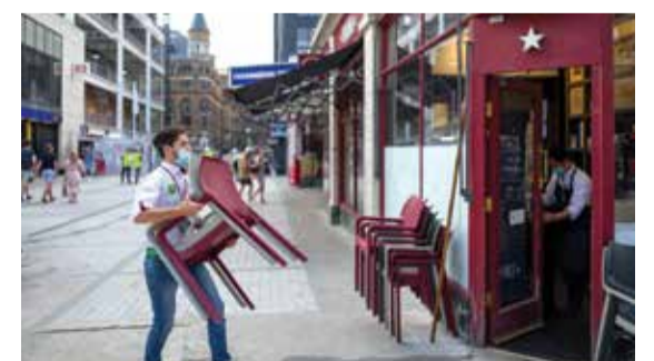
LONDON: A worker puts away chairs in London. Britain is in recession, official data showed Thursday, dealing another blow to embattled Prime Minister Rishi Sunak. — AFP

While economists predicted that the recession could be short-lived, the data is a big setback for Sunak, who has placed economic growth as a key priority. It comes as the Conservatives badly trail the main opposition Labor party in polls. Ahead of the