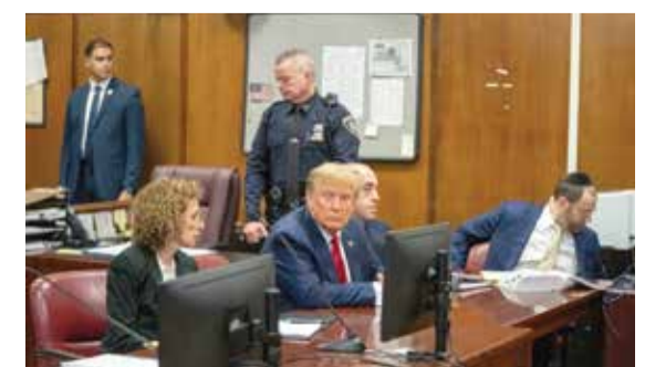
Former US President Donald Trump attends a hearing at Manhattan Criminal Court in New York City on February 15, 2024.

In that case he risks having to pay up to $370 million and faces a ban from conducting business in New York state. And he also faces another possible trial alleging conspiracy to overturn the 2020 election in Washington. Trump has used the numerous legal cases to fuel his claims of being victimized as he campaigns for a return to the White House. The hush money case dates to the closing days of the 2016 election when Trump was on the cusp of his shock win as a political outsider against Democratic candidate Hillary Clinton. A New York grand jury indicted Trump in March 2023 over the payments made to Daniels, whose real name is Stephanie Clifford. Prosecutors say the money was paid to silence Daniels over claims she had a tryst with Trump in 2006 - a year after he married Melania Trump.