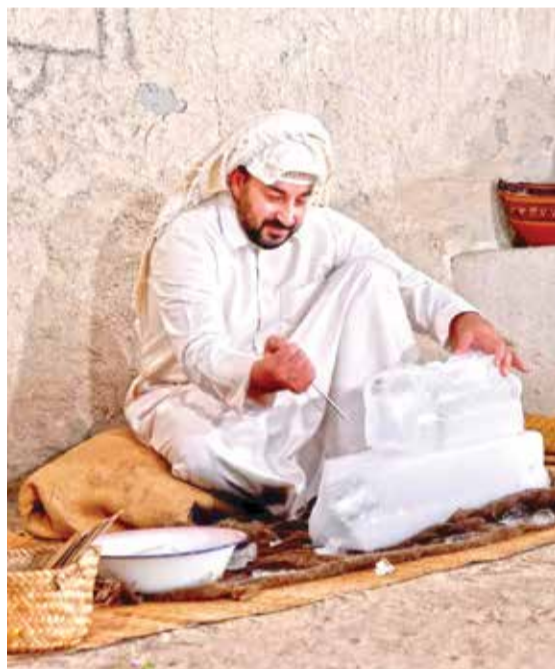
A man practicing the traditional craft of breaking and selling ice.

Since its beginnings in 2018, the troupe has been spreading cultural and heritage awareness through active participation in many national events inside Kuwait, collaborating with various ministries and entities, including universities such as Kuwait University, heritage museums such as Beit Othman, and historical districts such as Souq Mubarakkiya. On a global level, the troupe has represented Kuwait in national celebrations undertaken in Bahrain and the United Arab Emirates. Additionally,