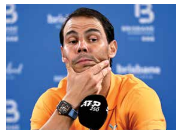
Spain's Rafael Nadal

"When I signed the contract I knew what would happen and that there could be some controversy. What I am going to do in Saudi Arabia is in line with what I have done all my life. I am a firm believer that education and sports can change lives and complicated situations into opportunities." "I'm not going to go to work in a way that I don't feel comfortable with," added Nadal who said his contract contains exit clauses. — AFP