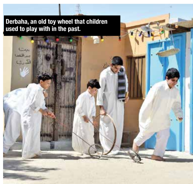
Derbaha, an old toy wheel that children used to play with in the past.