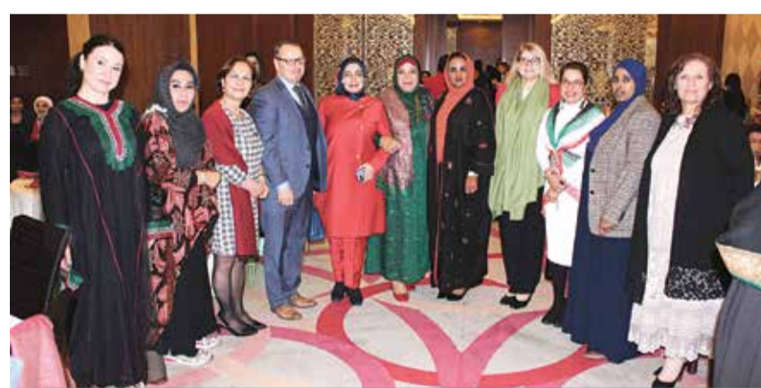
The International Women's Group marks Kuwait National and Liberation Days on Sunday, 11 February 2024, at the Crowne Plaza.