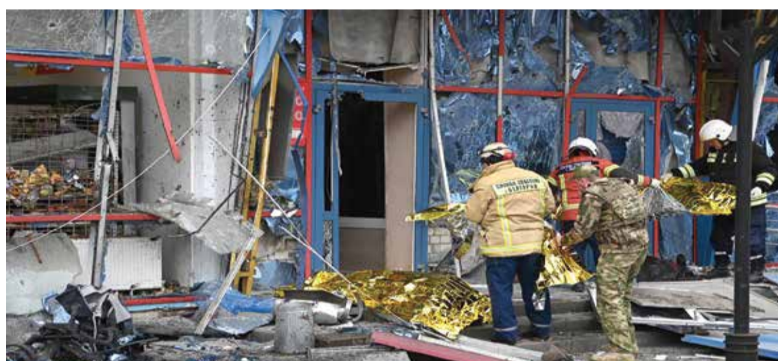
BELGOROD: This handout photograph published on the official Telegram account of Belgorod region governor Vyacheslav Gladkov, on February 15, 2024, shows rescuers working at a damaged shopping centre following an air attack on Belgorod.

The battle for the industrial hub, less than 10 kilometers north of the city of Donetsk, has been one of the bloodiest of the two-year war. It has drawn comparisons with last year's grinding fight for Bakhmut, in which tens of thousands of soldiers were killed. Should Russian forces punch through