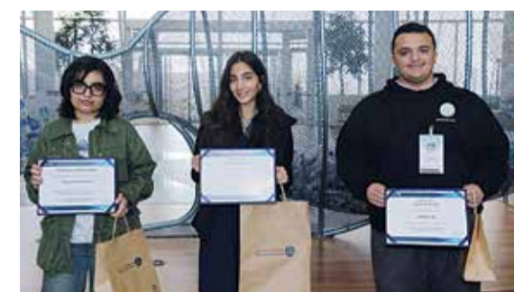
KUWAIT: Scientific center organizes environmental warrior competition. The program is aimed at consolidating the concepts of sustainability and environmental preservation.

He explained that the ceremony was an opportunity to highlight the winning photographic works and honor the students who were able to highlight