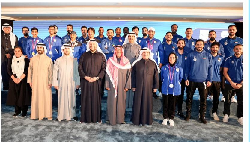
KUWAIT: HH the Prime Minister Sheikh Dr Mohammad Sabah Al-Salem Al-Sabah attended a ceremony on Feb 15, 2024 to honor Kuwaiti athletes who won medals at the 19th Asian Games, as well as athletes who have qualified for the 2024 Paris Olympics and members of the national handball team who have qualified for the 2025 World Men's Handball Championship. (See Page 16)