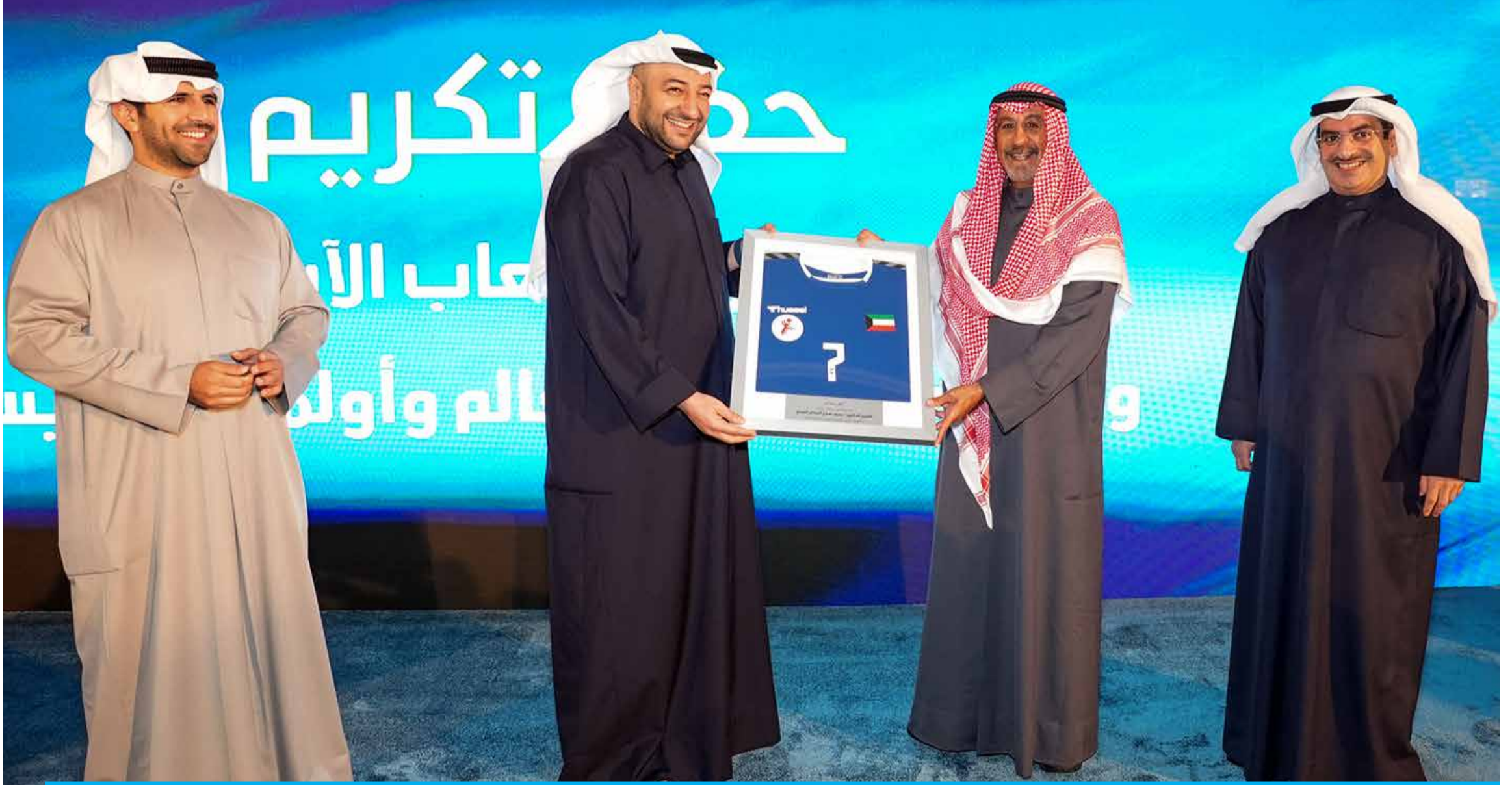
KUWAIT: (From left) President of Kuwait Olympic Committee Sheikh Fahad Naser Al-Ahmad Al-Sabah, State Minister for National Assembly Affairs, State Minister for Youth Affairs Dawood Maarafi, HH the Prime Minister Sheikh Mohammad Sabah Al-Salem Al-Sabah and Director General of Public Authority for Sports Yousuf Al-Baidan.

'You are good seeds sown by forefathers'