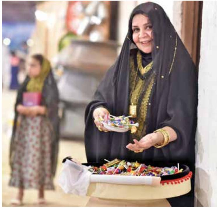
A woman holds a basket of Girgian, a mix of candies and sweets.