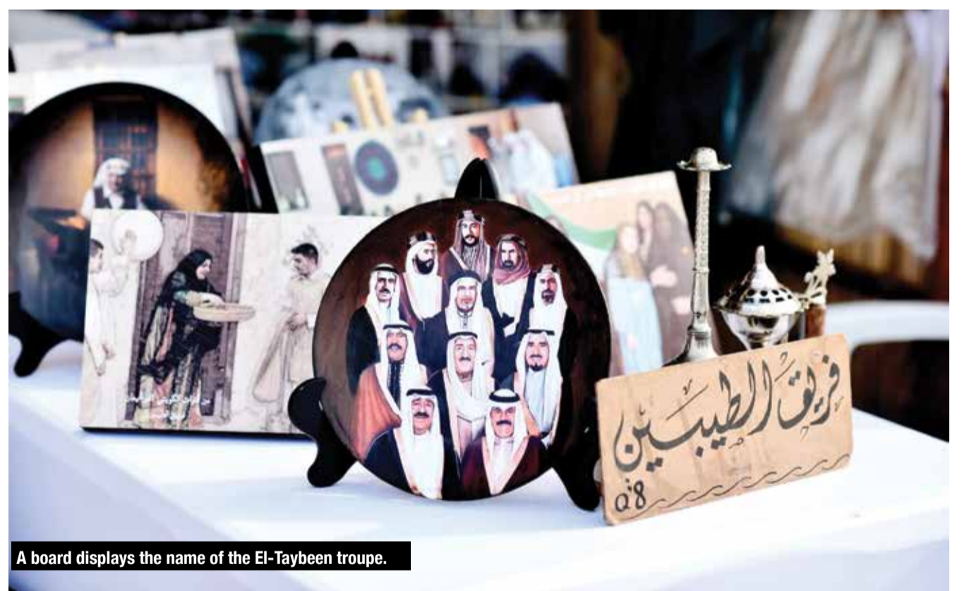
A board displays the name of the El-Taybeen troupe.

the troupe has been featured in popular TV and radio shows, particularly during special seasons such as Ramadan.