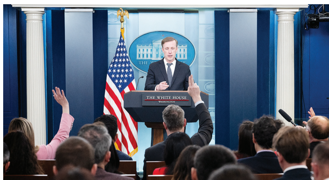
WASHINGTON: US National Security Adviser Jake Sullivan takes questions during the daily press briefing in the Brady Briefing Room of the White House in Washington, DC, February 14, 2024. Ukrainian troops are starting to run out of ammunition as a huge package of US war aid requested by President Joe Biden remains blocked by Republicans in Congress, Sullivan told reporters.

He refused to confirm he would discuss the security threat, but pointed to the significance by saying it was