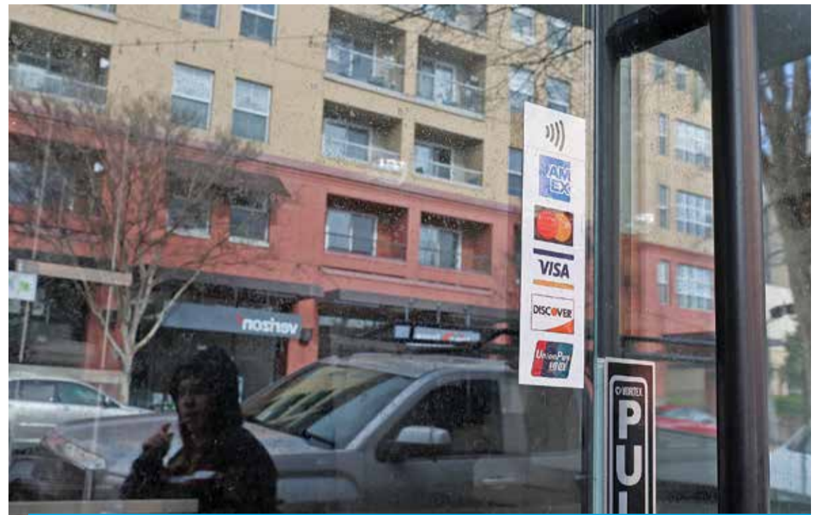
CALIFORNIA: A credit card decal is displayed on the window of a business in San Rafael, California. According to a report by the Federal Reserve Bank of New York, credit card debt in the United States has reached $1.13 trillion.