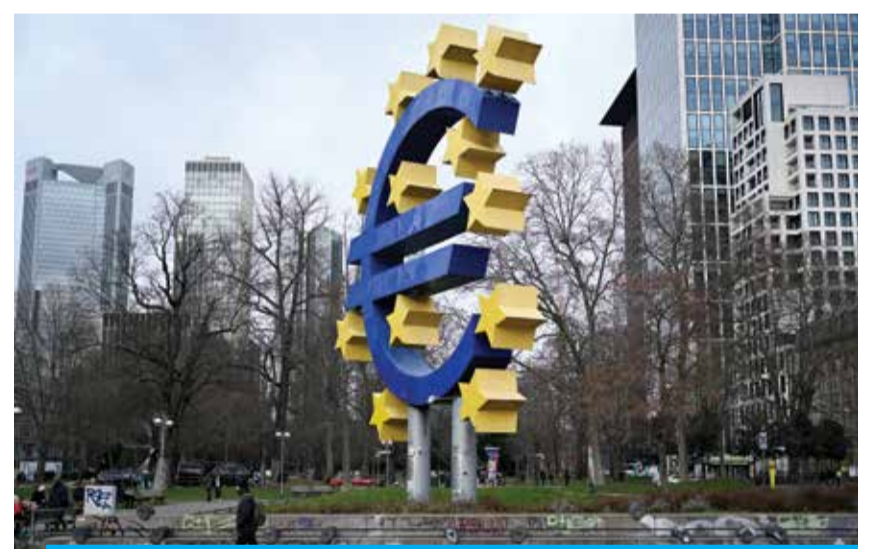
FRANKFURT: A sculpture of the Euro currency stands in the city centre of Frankfurt am Main, western Germany.

The commission was also optimistic that despite the expiry of energy support measures and trade disruptions in the Red Sea, those issues would not derail falling inflation in the longer term. "The European economy has left behind it an extremely challenging year, in which a confluence of factors severely tested our resilience," the EU's economy commissioner, Paolo Gentiloni, said. "The rebound expected in