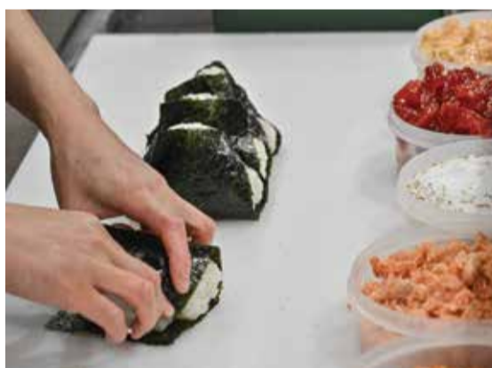
TOKYO: Photo shows a staff member making rice balls, known as 'onigiri', at the restaurant Onigiri Bongo in the Otsuka area of Tokyo.