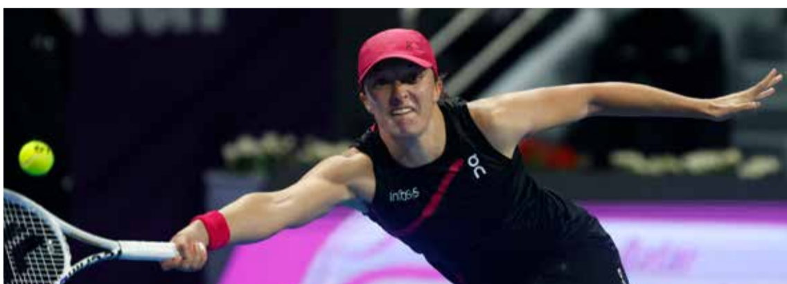
DOHA: Poland's Iga Swiatek in action during her round of 16 match against Russia's Ekaterina Alexandrova during their Women's Singles tennis match at the Qatar WTA Open at Khalifa International Tennis and Squash Complex in Doha on February 14, 2024.