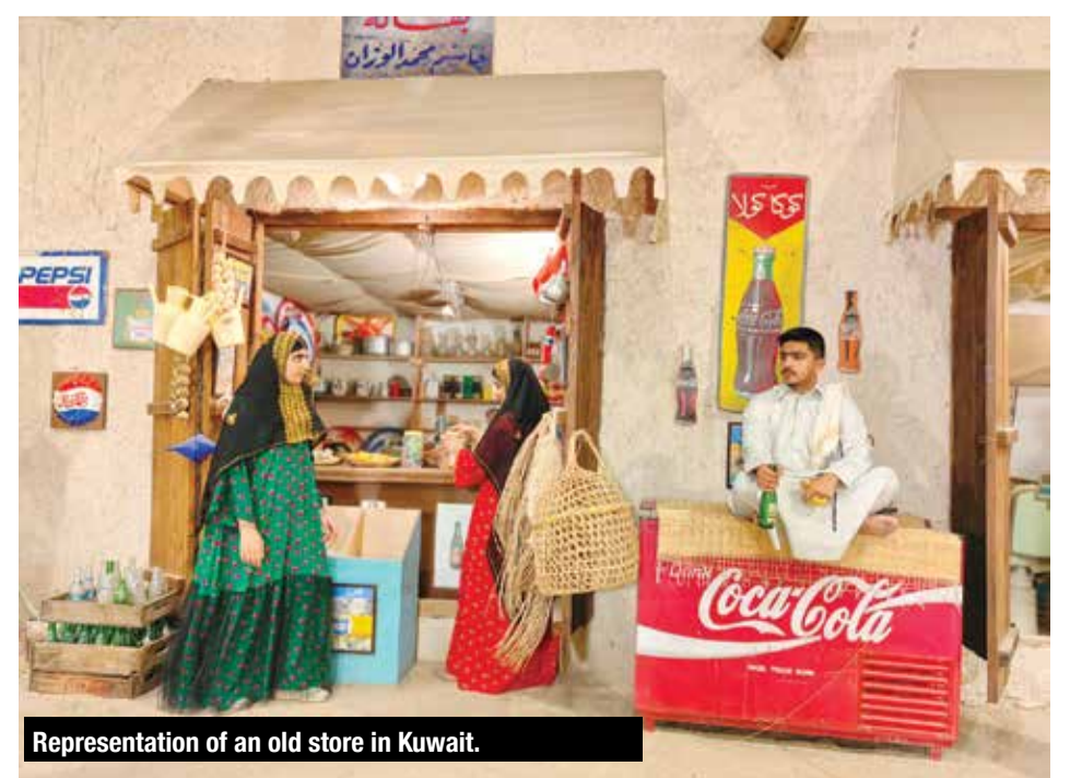
Representation of an old store in Kuwait.