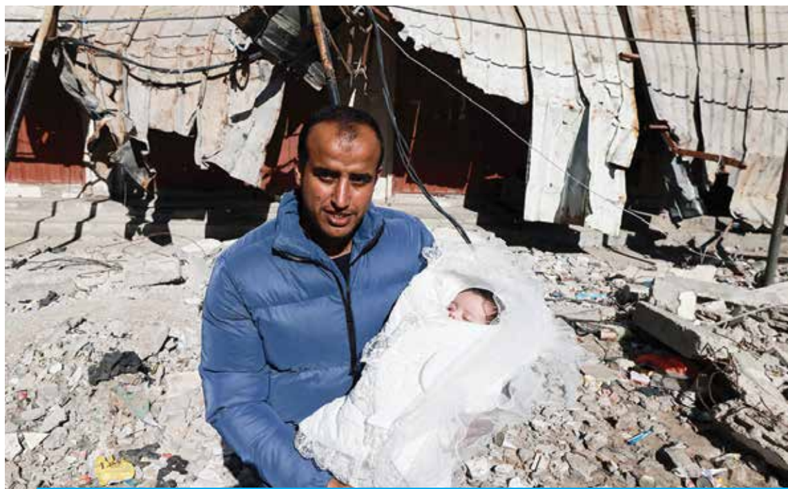
GAZA: A man poses for a picture with his newborn baby on the rubble of a building destroyed in Zionist bombing in Rafah in the southern Gaza Strip on Feb 11, 2024.