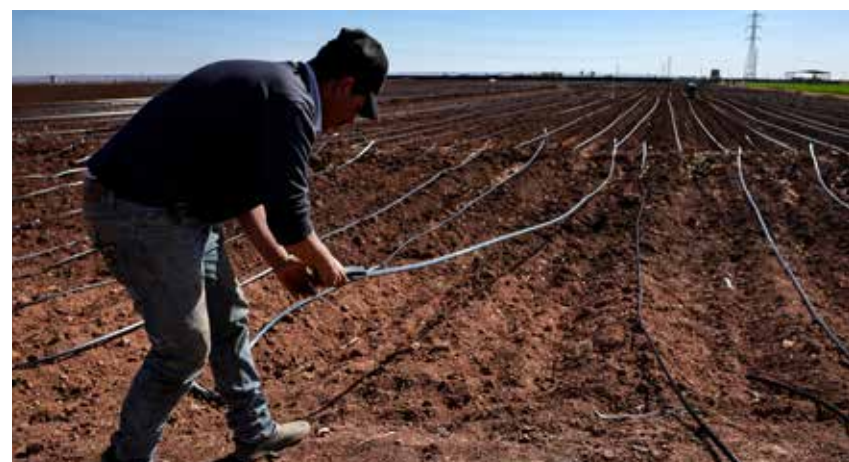
BERRECHID, Morocco: A farmer installs a drip system on a potato field in Berrechid, Morocco's historically wheat-rich province situated some 40 kilometers (about 25 miles) southeast of Casablanca, on February 7, 2024, amid sixth consecutive years of drought.