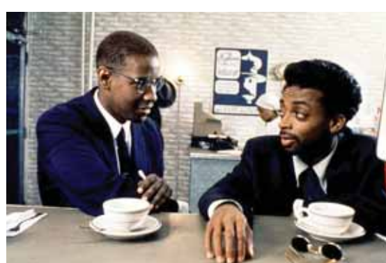
Denzel Washington and Spike Lee

His film "Ikiru" was recently adapted into English for 2022 Oscar-nominated drama "Living" — a film which transposed events from the original's Japanese setting to 1950s London. Apple did not provide any details on the setting for the new English-language reinterpretation, co-written by Lee.