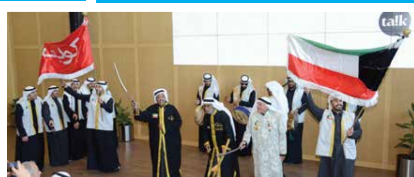
Singers perform Kuwaiti traditional dance.

Within the indoor exhibition area, a stage served as a platform for each participating country to showcase their traditional dance, making "The People's Forum" at Kuwait University a celebration of diversity, as nations came together to share information about their country and learn others' unique cultures.