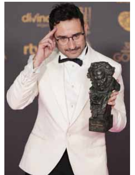
Spanish film director Juan Antonio Bayona poses on the red carpet.