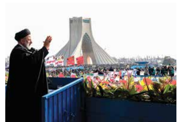
TEHRAN: This handout picture provided by the Iranian Presidency on February 11, 2024, shows Iran's President Ebrahim Raisi addressing the crowd in Tehran's Azadi (freedom) square, on the occasion of the 45th anniversary of the Islamic Revolution.

Raisi demanded that the "bombing of Gaza should be stopped as soon as possible" and declared that "the death of the Zionist regime has come", in his speech to thousands at Azadi Square in western Tehran. He asked about the Zionist entity: "How can a regime that has violated 400 statements and resolutions of international organizations adhere to UN covenants?" "We believe that one of the important steps that should be taken is the expulsion of the Zionist regime from the United Nations."