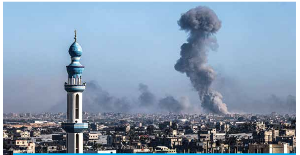
RAFAH, Palestinian Territories: A picture taken from Rafah shows smoke billowing during Zionist bombardment over Khan Yunis in the southern Gaza Strip on Feb 11, 2024.

Egypt, Jordan, and Morocco have succeeded with comprehensive subsidy reform plans featuring robust public communications, appropriate phasing of price increases, and targeted cash support for the most vulnerable. The third way to nourish the fiscal tree is: improve the performance of state-owned enterprises. We have a saying at the IMF — it's not only what you owe, it's what you own. And Arab-world SOEs own a lot, with assets exceeding 50 percent, and even 100 percent of GDP in some countries.