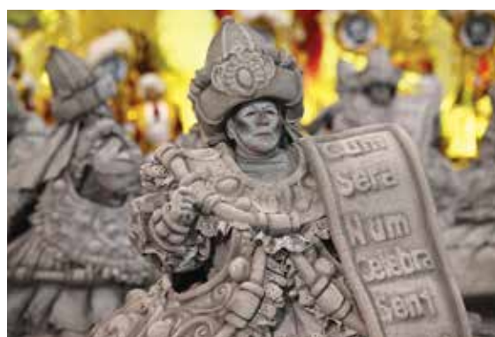
A reveler of the Mocidade Alegre samba school performs.