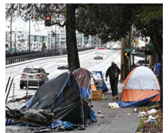
PORTLAND: A pedestrian walks past an encampment of tents after crossing Hoyt Street in Portland, Oregon on January 24, 2024.