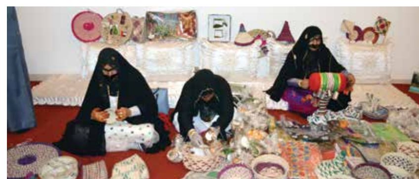
United Arab Emirates' corner