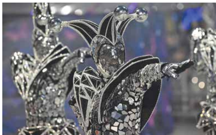
A reveler of the Gavioes da Fiel samba school performs during the second night of carnival at the Sambadrome in Sao Paulo, Brazil, early.