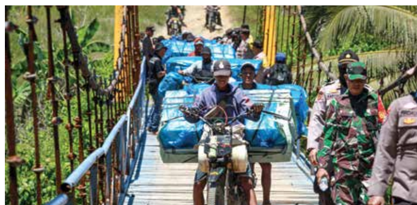
LAMPUNG: The logistics unit of the General Elections Commission ride motorbikes to deliver election materials by motorbike to remote polling stations.