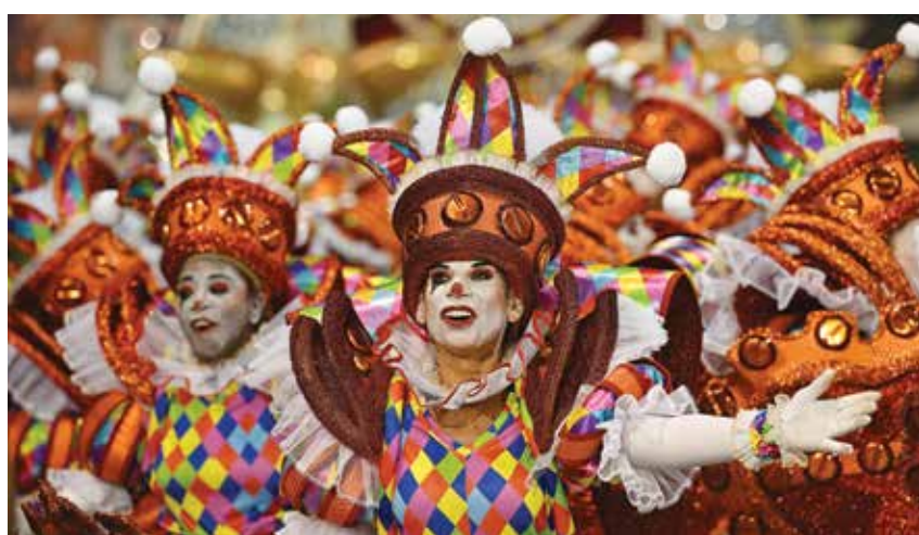
Revelers of the Mocidade Alegre samba school perform during the second night of carnival at the Sambadrome.