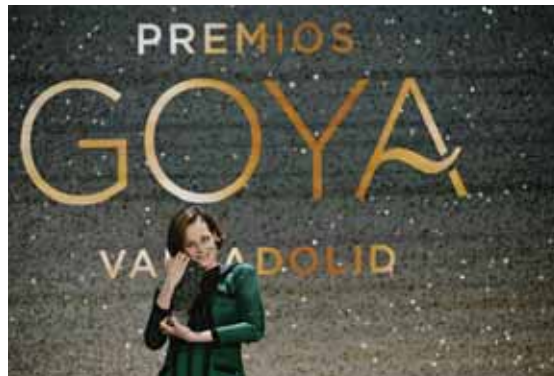
American actress Sigourney Weaver delivers a speech after receiving the International Goya Award for her career at the 38th Goya Awards ceremony.