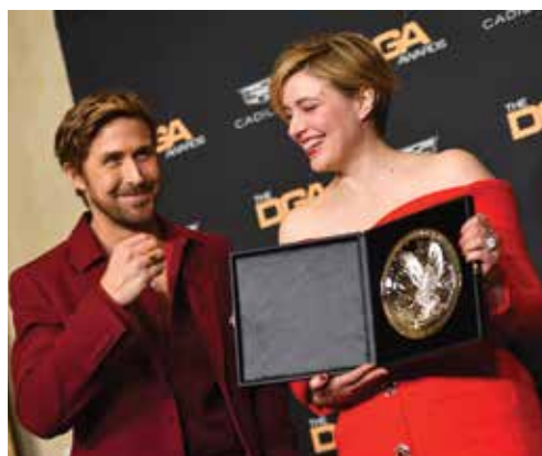
Canadian actor Ryan Gosling stands with US director Greta Gerwig holding the nominee medallion as she is nominated for Outstanding Directorial Achievement in Theatrical Feature Film for "Barbie".