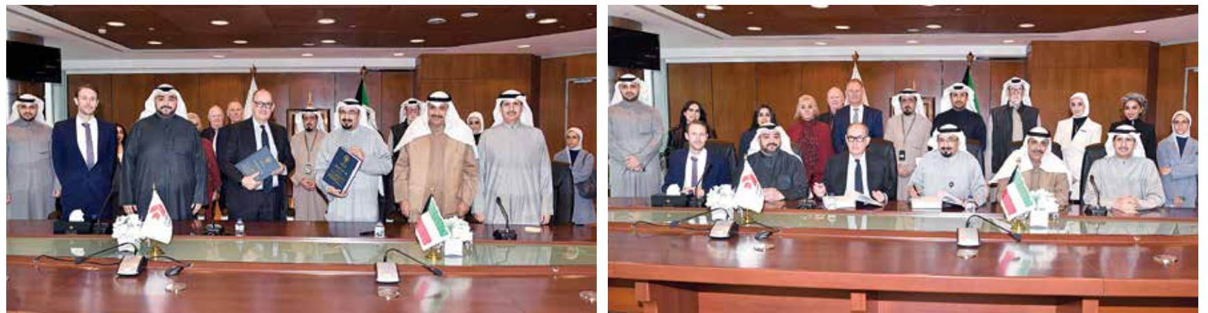
Kuwait Civil Aviation, German company sign KD 8 million multi-projects contract.

KUWAIT: The Directorate General of Civil Aviation (DGCA) signed on Sunday a contract with the German company Leonardo to execute three projects at Kuwait International Airport worth KD 8 million (about $25.9 million). The three projects were related to the installation, operation, and provision of training, warranty, maintenance, and technical sup-