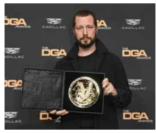
Outstanding Directorial Achievement in Documentary winner Ukrainian filmmaker Mstyslav Chernov for "20 Days in Mariupol".