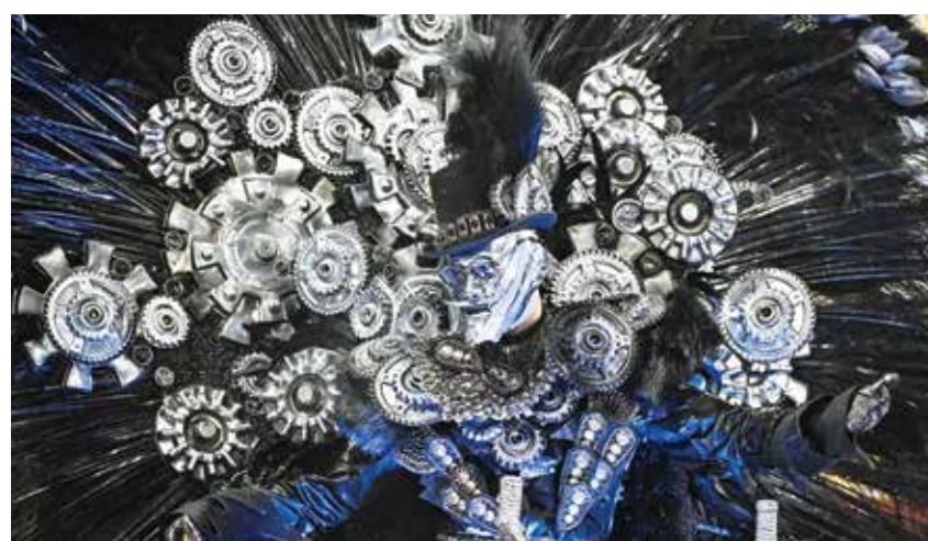
A reveler of the Mocidade Alegre samba school performs.

Avoid being alone in a crowd, opt for canned drinks over potentially drugged cocktails, scan a QR code to access emergency resources — as Rio enters carnival season, there has been a flood of advice on how women can stay safe. The “cidade maravilhosa,” or wonderful city of Rio, on Friday officially inaugurated its emblematic festival, becoming the scene of countless street parties, the traditional “blocos” that can draw hundreds of thousands of people.