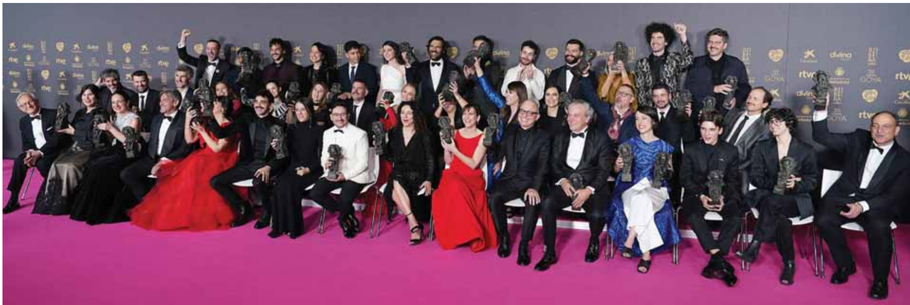
Award winners pose for pictures after the 38th Goya Awards ceremony in Valladolid.