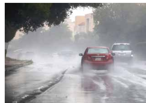
KUWAIT: Cars drive through heavy rain in Kuwait City in stormy weather on February 11, 2024.