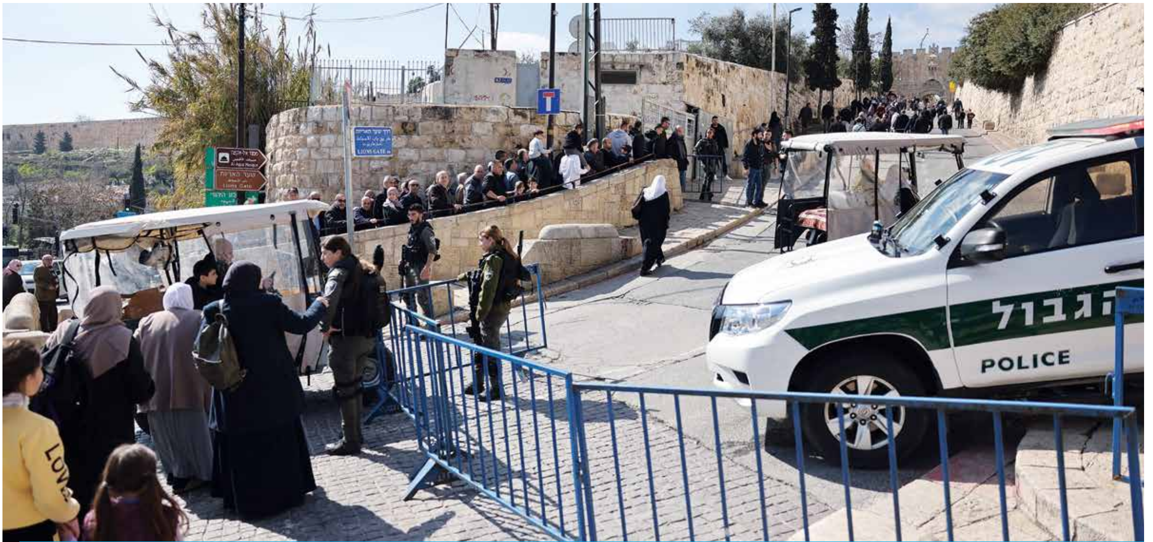
JERUSALEM: Zionist security forces stand guard as Muslim worshippers wait at a checkpoint near Lion's Gate to enter the Al-Aqsa Mosque compound before the Friday noon prayer, in Jerusalem on February 9, 2024.