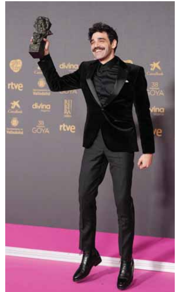
Spanish actor David Verdaguer poses for pictures after receiving the Best Leading Actor award for his role in "Saben aquell".