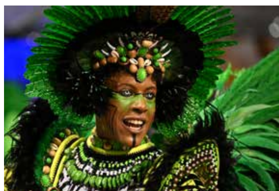
A reveler of the Mocidade Alegre samba school performs.