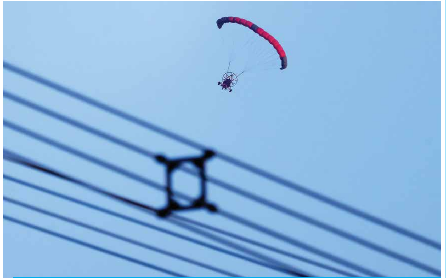
KUWAIT: A paraglider flies over a camping area. The camping season is ongoing, and many people took the opportunity to escape to vast deserts and open air spaces away from the bustle of the city and closed commercial complexes.