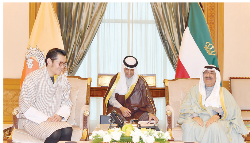
KUWAIT: HH the Amir Sheikh Mishal Al-Ahmad Al-Jaber Al-Sabah receives at Seif Palace King of Bhutan Jigme Khesar Namgyel Wangchuck and his delegation during their official visit to the country on Feb 11, 2024.

GAZA: Hamas warned the Zionist entity on Sunday that a ground offensive into Gaza's far-southern city of Rafah, crowded with displaced Palestinians, would imperil the release of captives held by fighters in the besieged territory. Foreign governments, including the Zionist entity's key ally the United States, and aid groups have voiced deep concern over Zionist Prime Minister Benjamin Netanyahu's vow to extend operations. Rafah, on the border with Egypt, has remained the last refuge for Palestinians fleeing the Zionist entity's relentless bombardment elsewhere in the Gaza Strip in its war against Hamas. "Any attack by the occupation army on the city of Rafah would torpedo the exchange negotiations," a Hamas leader told AFP on condition of anonymity. The Zionist premier has told troops to prepare to go into the city which now hosts more than half of Gaza's total population, spurring concern about the impact on displaced civilians. Netanyahu told US broadcaster ABC News that those who urged the