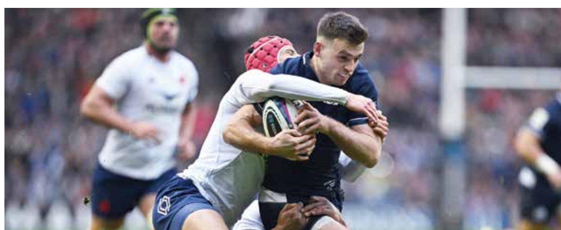
EDINBURGH: Scotland's scrum-half Ben White (R) runs to the line tackled by France's wing Louis Biele-Biarrey (L) and France's centre Jonathan Danty (C) in the build-up to the first try during the Six Nations international rugby union match between Scotland and France at Murrayfield Stadium in Edinburgh, Scotland.

For the first time since taking charge in the wake of the 2019 World Cup, Galthie's position is being questioned. But a hard-fought victory kept alive France's hopes of winning back the Six Nations title