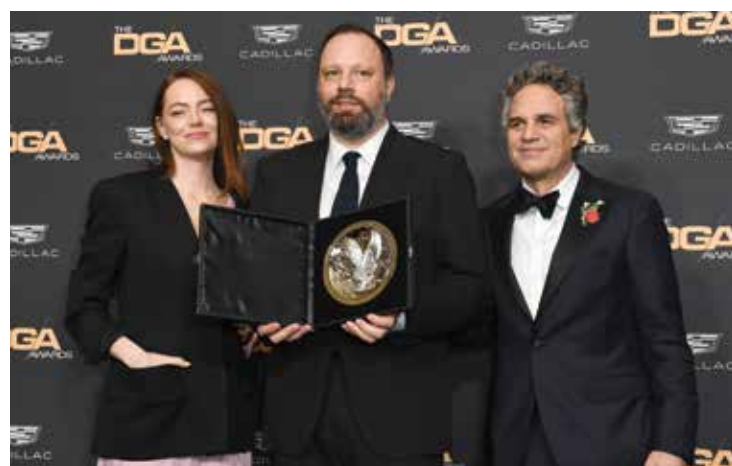
US actor Mark Ruffalo and US actress stand with Greek director Yorgos Lanthimos holding the nominee medallion as he is nominated for Outstanding Directorial Achievement in Theatrical Feature Film for "Poor Things".