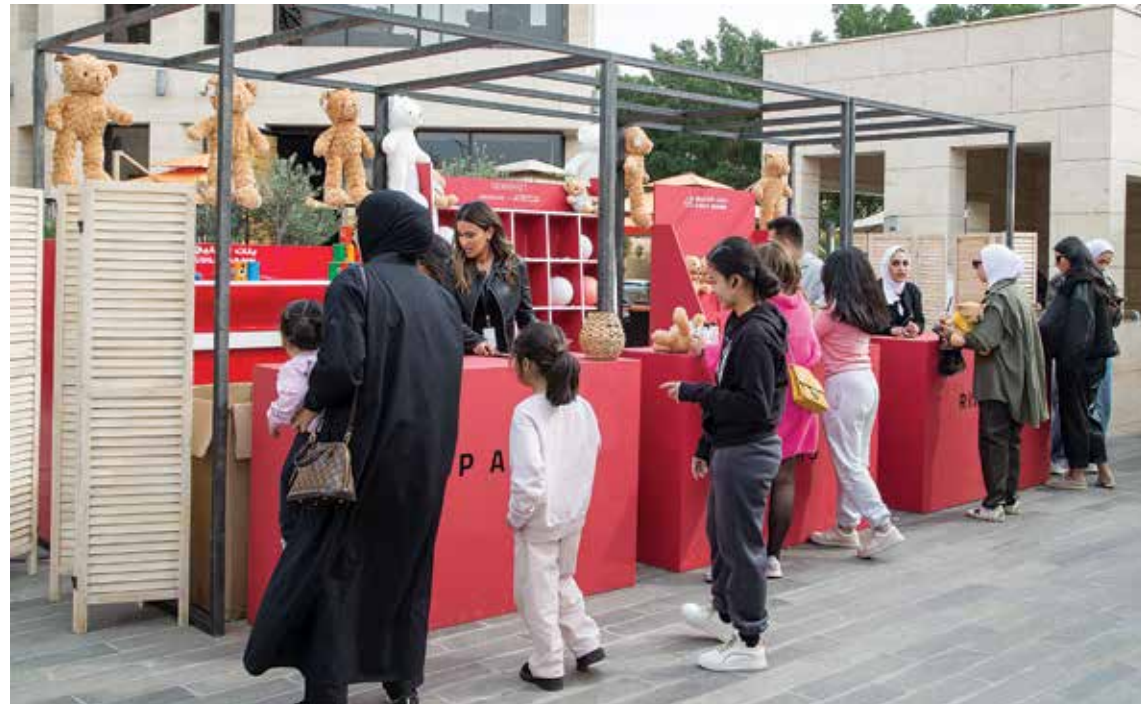
Participants engage in activities during the event.

11 small to medium-sized businesses participated in the event