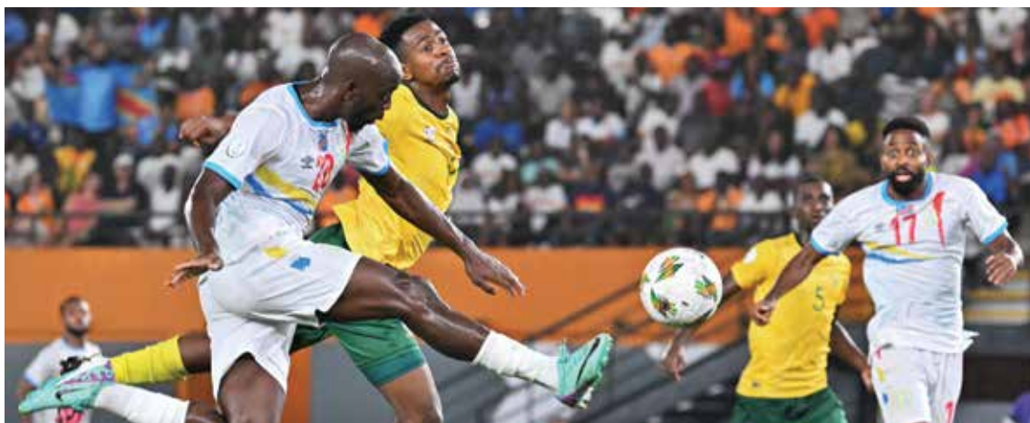
ABIDJAN: DR Congo's forward #20 Yoane Wissa fights for the ball with South Africa's defender #3 Terrence Mashego during the Africa Cup of Nations (CAN) 2024 third place play-off football match between South Africa and Democratic Republic of Congo at Felix Houphouët-Boigny Stadium in Abidjan.

in two minutes just after the hour mark. Saka's first had been his 50th Arsenal goal and he cut inside to fire home in trademark fashion on his left foot. Rice then rubbed salt in West Ham wounds with a stunning finish into the top corner from outside the box. The 25-year-old refused to celebrate out of respect for his former teammates and supporters. But after Arsenal were criticized by some members of the media for going overboard in their celebrations of a 3-1 win over Liverpool last weekend, there was even more for Arteta and his players to get excited about.