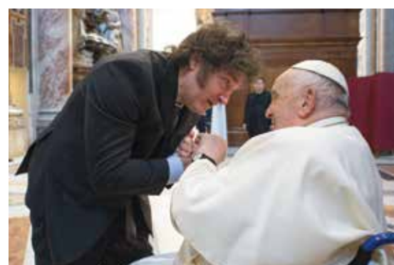
VATICAN CITY: This handout photograph taken on February 11, 2024 and released by the Vatican press office, Vatican Media, shows Pope Francis (right) greeting Argentine President Javier Milei (left) at the Vatican.

Last year, Milei accused the pope of interfering in politics, and failing to condemn dictators such as Cuba's Fidel Castro. But the pope has brushed off the criticism as rhetoric in the heat of an election campaign. On Sunday, Milei sat with his entourage during the mass to canonize 18th century missionary Mama Antula, considered a human-rights pioneer from when Argentina was a Spanish colony. Like Francis, the consecrated Jesuit laywoman born Ma-