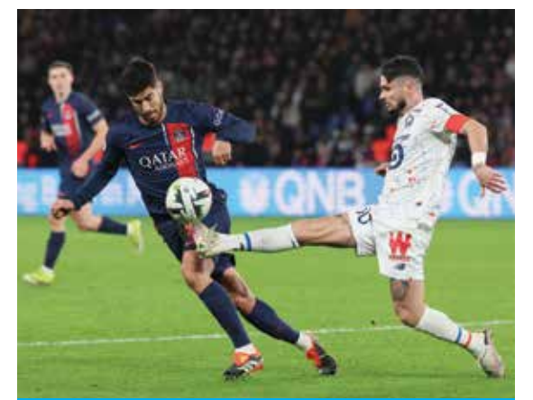
PARIS: Lille's French midfielder #10 Remy Cabella (R) stretches to control the ball ahead of Paris Saint-Germain's Spanish forward #11 Marco Asensio (L) fight for the ball during the French L1 football match between Paris Saint-Germain (PSG) and Lille LOSC at the Parc des Princes stadium in Paris.

Ousmane Dembele helped bring PSG level four minutes later by stealing the ball from Lille centre-back Alessandro and squaring for Goncalo Ramos to stroke into an empty net. Alessandro was again at fault shortly after as he sliced Fabian Ruiz's cross into his own goal while attempting to clear, handing the French champions the lead.