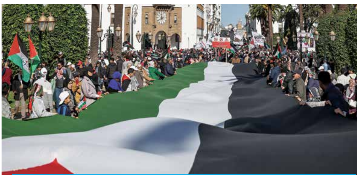
RABAT: Protesters lift a giant flag of Palestine during a demonstration in Rabat on February 11, 2024 in solidarity with Palestinians. — AFP

The Zionist entity first erected military checkpoints in the West Bank following the first Palestinian uprising or intifada in 1987, but the number increased after the start of the second intifada in 2000. Since then, earthen barriers, gates, or cement block around 700 roads across the West Bank, according to the Palestinian Authority's Abu Rahmah, who heads a team monitoring settler activity. — AFP