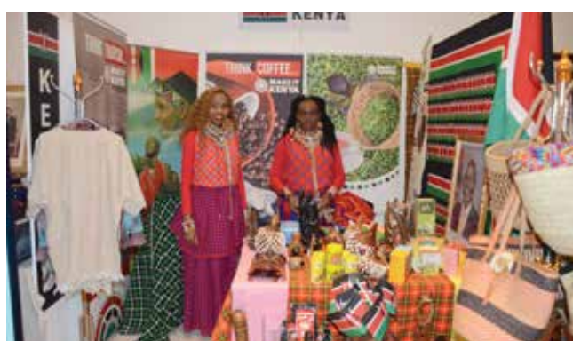
Visitors visit Kenya's booth.

Moreover, participants from the Kuwait Center for Down Syndrome showcased