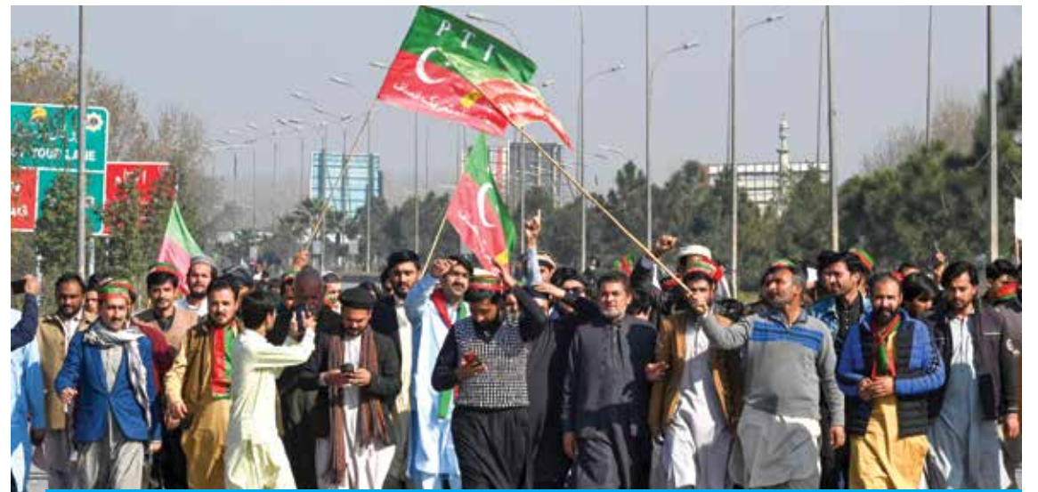
PESHAWAR: Supporters of Khan's Pakistan Tehreek-e-Insaf (PTI) party block Peshawar to Islamabad highway as they protest against the alleged skewing in Pakistan's national election results, in Peshawar on February 11, 2024.

Still, PTI leaders insist they have been given a "people's mandate" to form the next government.