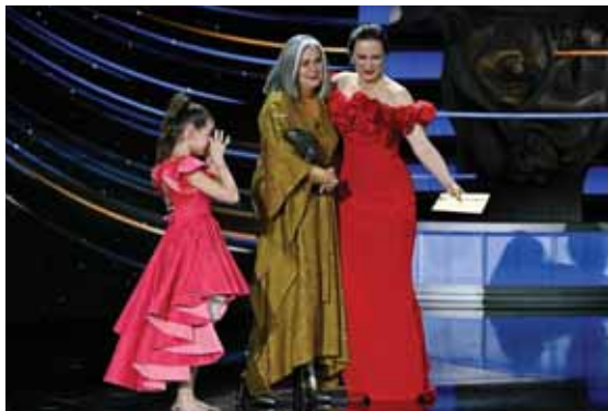
Spanish actress Ane Gabarain receives the Best Supporting Actress award for her role in "20,000 especies de abejas" (20,000 species of bees).