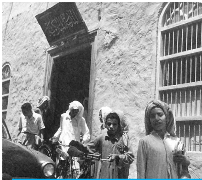
Students leaving Mubarkiya School.

were busy with the diving season as they had to earn a living. People had to afford to live independently from working.