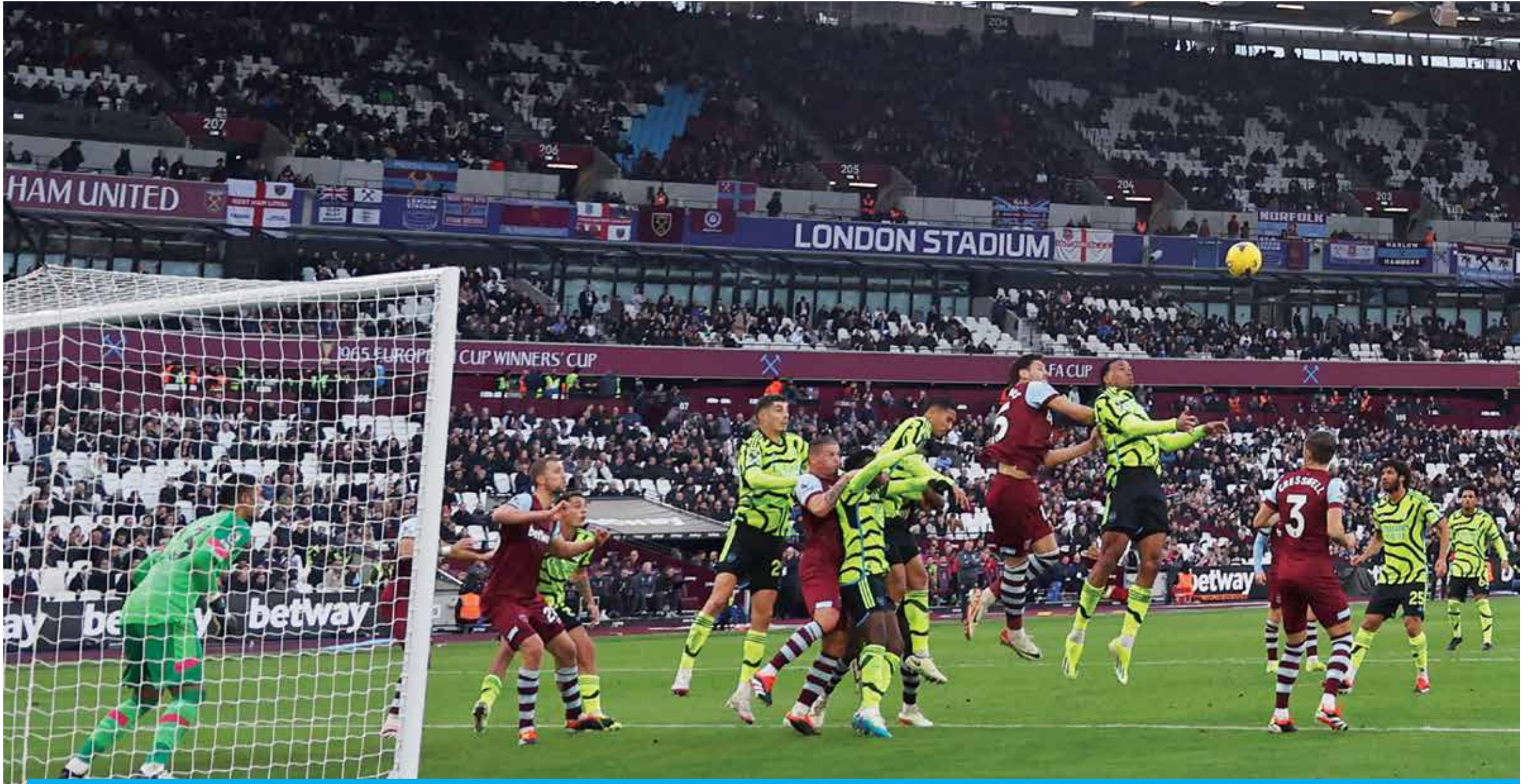
LONDON: Players compete for the ball in the West Ham goalmouth during the English Premier League football match between West Ham United and Arsenal at the London Stadium, in London on February 11, 2024.