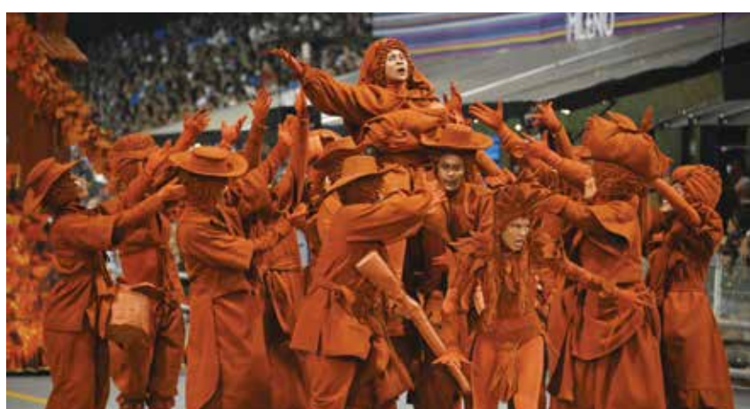
Revelers of the Academicos do Tatuape samba school perform.