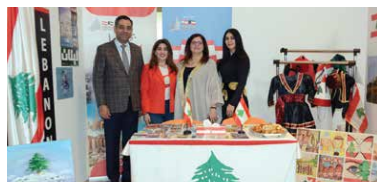
Lebanon's booth showcases the beauty of Lebanon.