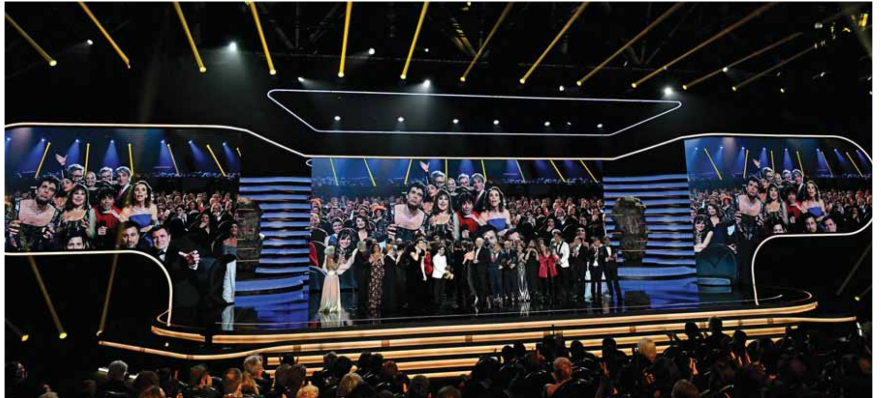
Cast members celebrate on stage after receiving the Best Film award for "La sociedad de la nieve" (Society of snow).

Citing the three women, El Pais said the alleged assaults happened between May 2014