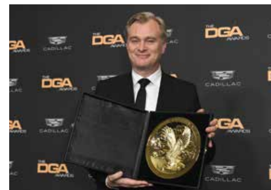
Outstanding Directorial Achievement in Theatrical Feature Film winner for "Oppenheimer" British-US director Christopher Nolan poses in the press room during the 76th Directors Guild of America awards.