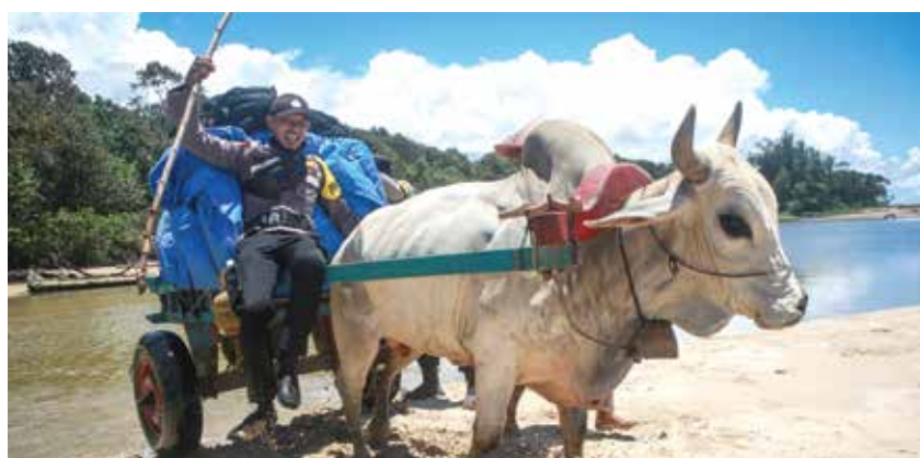
Ox carts carry election materials of the General Elections Commission on the beach to deliver to remote polling stations.