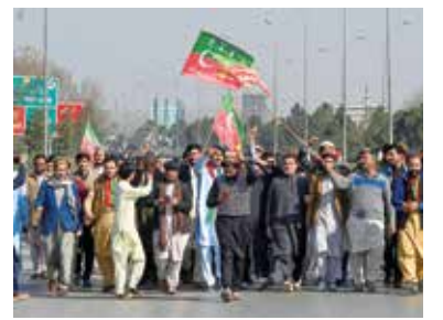
Pakistan police clash with Khan supporters at protests