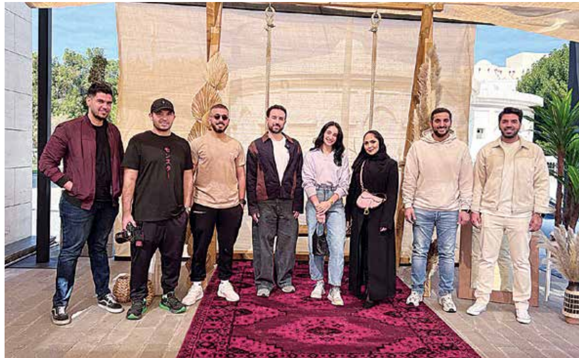
Gulf Bank's corporate communications team poses for a group photo.

KUWAIT: In the midst of a bustling crowd and considerable public interest, Gulf Bank wrapped up its GB Market event, highlighting the involvement of approximately 11 businesses and initiatives exclusively owned by young Kuwaitis. These enterprises represented diverse sectors, including perfumes, jewelry, restaurants, and cafes. Participants were selected through competitions and voting by followers on Gulf Bank's social media platform, reflecting their preferences for specific stores and products.