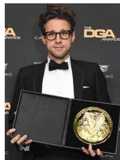
Outstanding Directorial Achievement in Comedy Series winner Christopher Storer for The Bear "Fishes".

'Power' Best documentary went to "20 Days in Mariupol," which portrayed in harrowing detail the arrival of war to a Ukrainian city