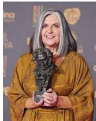
Spanish actress Ane Gabarain poses for pictures after receiving the Best Supporting Actress award for her role in "20,000 especies de abejas" (20,000 species of bees).