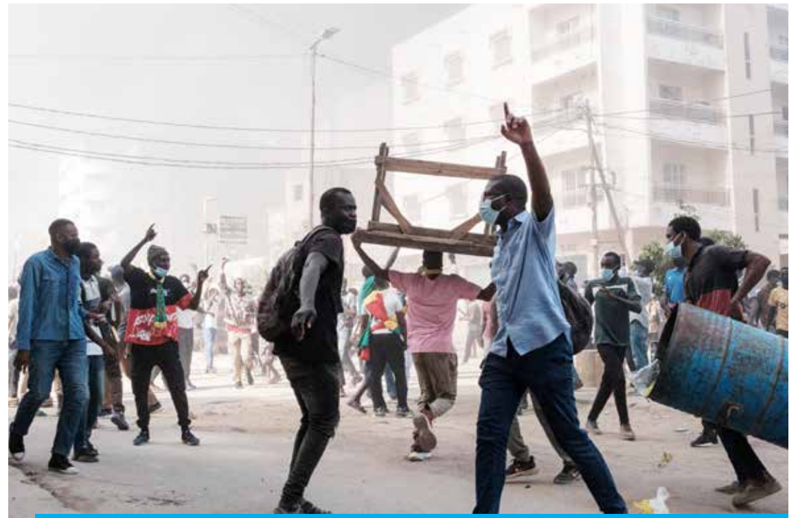
DAKAR: Protesters shout slogans and collect barrels and tables to burn during clashes with police on the sidelines of a protest against a last-minute delay of presidential elections in Dakar on February 9, 2024.

Senegal's parliament backed the move on Monday and voted to keep Sall in office until his successor takes over, which is unlikely to be before early 2025. His second term had been due to end on April 2. Campaigners from the Aar Sunu Election group (Protect our Election) have called for fresh protests on Tuesday.