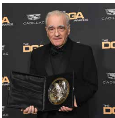
US film director Martin Scorsese holds the nominee medallion as he is nominated for Outstanding Directorial Achievement in Theatrical Feature Film for "Killers of the Flowers Moon".

The other directors nominated by the DGA for its top prize this year were Martin Scorsese ("Killers of the Flower Moon"), Greta Gerwig ("Barbie"), Yorgos Lanthimos ("Poor Things") and Alexander Payne ("The Holdovers"). Nolan will go head-to-head with Scorsese and Lanthimos again at the Oscars, but notably not Gerwig, whose apparent snubbing by the Academy as direc-