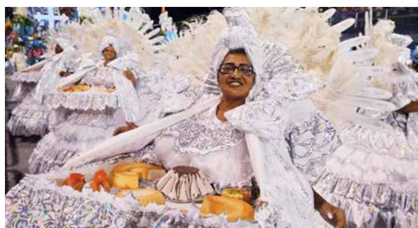
Revelers of the Academicos do Tatuape samba school perform.