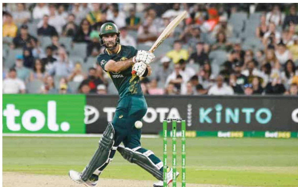
ADELAIDE: Australia's Glenn Maxwell plays a shot during the second Twenty20 international cricket match between Australia and West Indies at the Adelaide Oval in Adelaide on February 11, 2024.

That brought Maxwell to the crease and he was looking for the boundary with every delivery, finding it frequently with a range of magnificent shots to reach a half-century off 25 balls. He shared an 82-run partnership with Stoinis (16) before being joined by fellow big-hitter Tim David (31 off 14) in a 95-run stand that saw him bring up his fifth T20 century.