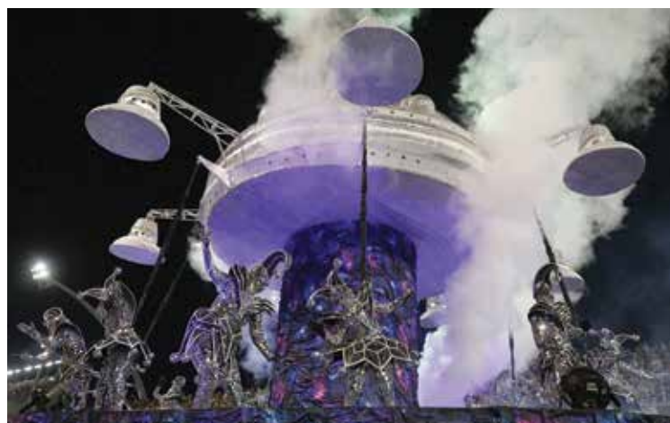
Revelers of the Gavioes da Fiel samba school perform during the second night of carnival at the Sambadrome.