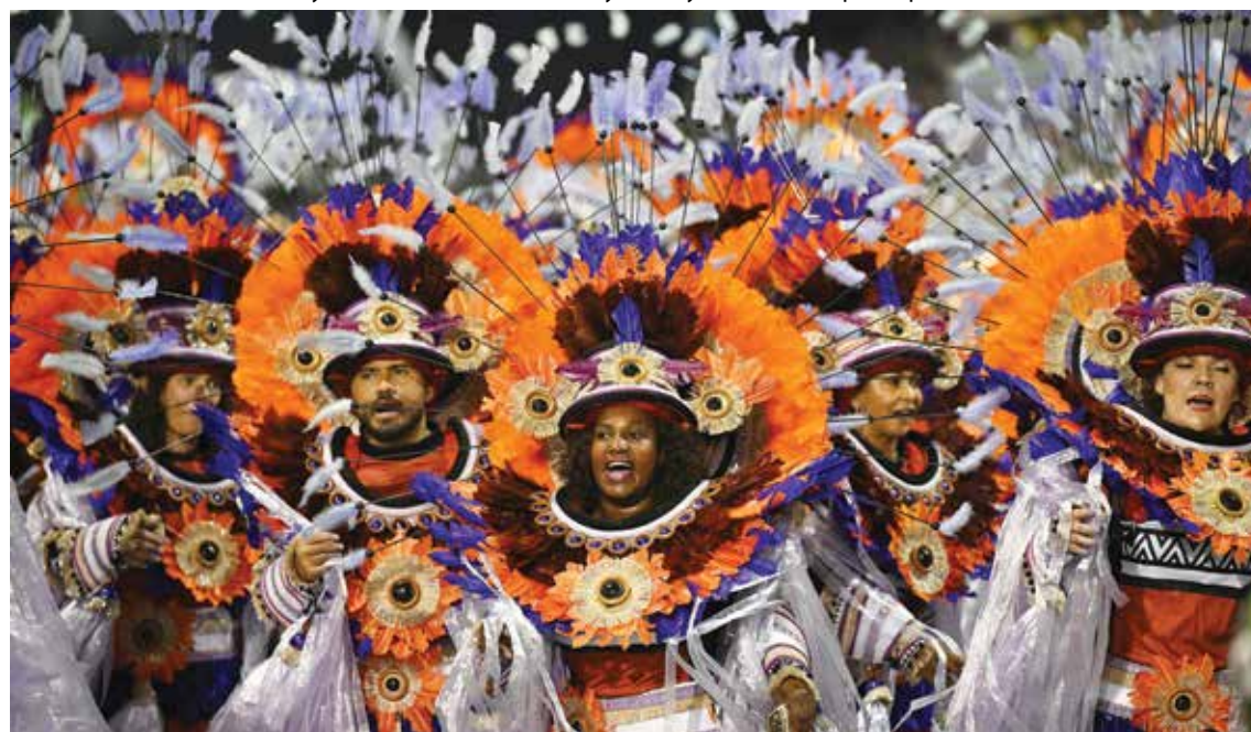
Revelers of the Tom Maior samba school perform.