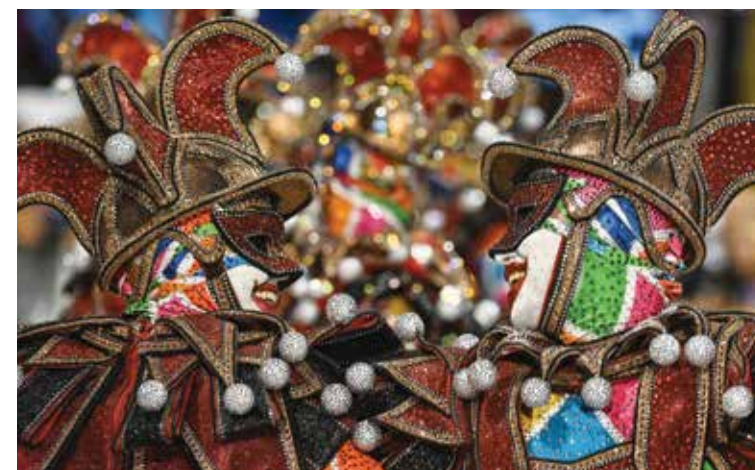
Revelers of the Mocidade Alegre samba school perform during the second night of carnival at the Sambadrome.