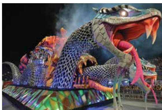
Revelers of the Tom Maior samba school perform.