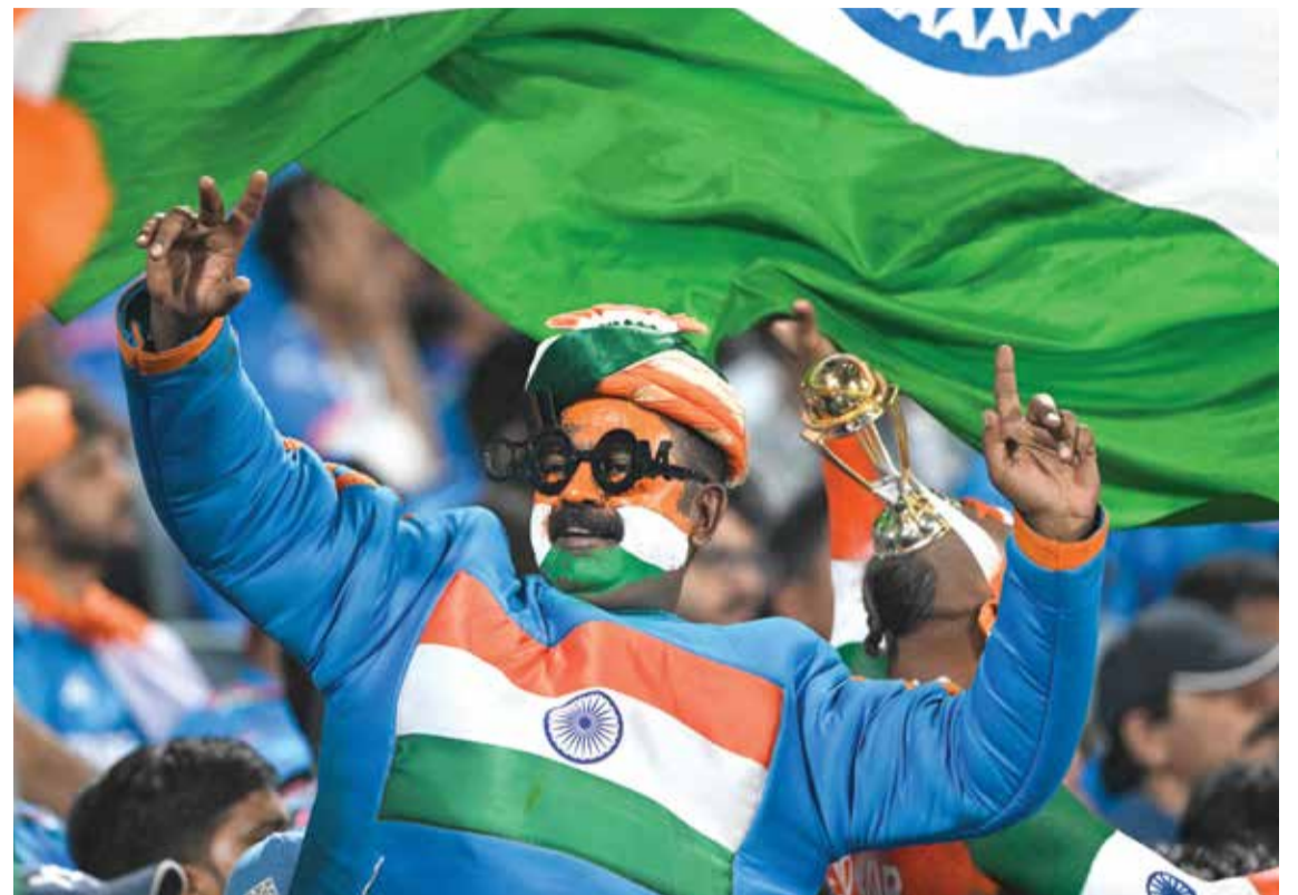
PUNE: An Indian fan cheers during the 2023 ICC Men's Cricket World Cup one-day international (ODI) match between India and Bangladesh at the Maharashtra Cricket Association Stadium in Pune on October 19, 2023.

Kohli, bowling in an ODI for the first time in six years, completed Pandya's over. Mushfiqur Rahim's 38 and fellow veteran Mahmudullah's 46 bolstered Bangladesh's total. But with left-arm spinner and regular skipper Shakib Al Hasan sidelined following the thigh injury suffered during Friday's eight-wicket loss to New Zealand in Chennai, it never looked enough. India's quest for a third World Cup title continues against New Zealand in Dharamsala on Sunday, with Bangladesh facing South Africa in Mumbai on Tuesday.