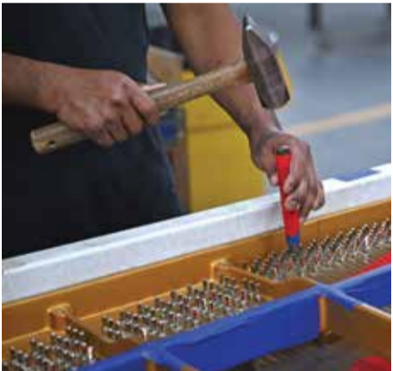
A worker builds the "Steinway X Disney: Mickey Mouse Limited Edition" piano at Steinway & Sons Factory.