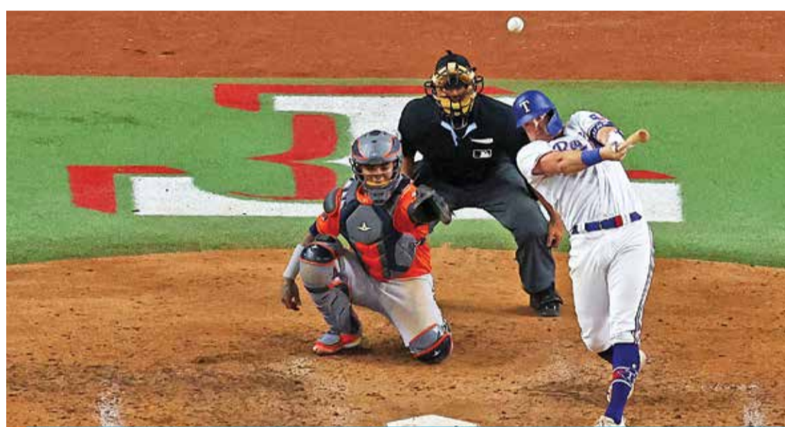
ARLINGTON: Josh Jung #6 of the Texas Rangers hits a two run home run against Hector Neris #50 of the Houston Astros during the seventh inning in Game Three of the American League Championship Series at Globe Life Field on October 18, 2023.

Mickelson, however, says there's more than meets the eye to the rejection. "I do want to bring to light as to why exactly they are doing what they are doing. It's not what they are putting out there," Mickelson said. "There's a lot more going on behind the scenes as to the importance of us to the getting points to (equal) the PGA Tour." American Brooks Koepka, this year's PGA Championship winner, and Australian Cameron Smith, last year's British Open champion, are the only LIV players still among the world rankings top 50, a key cutoff point for entry into major tournaments.