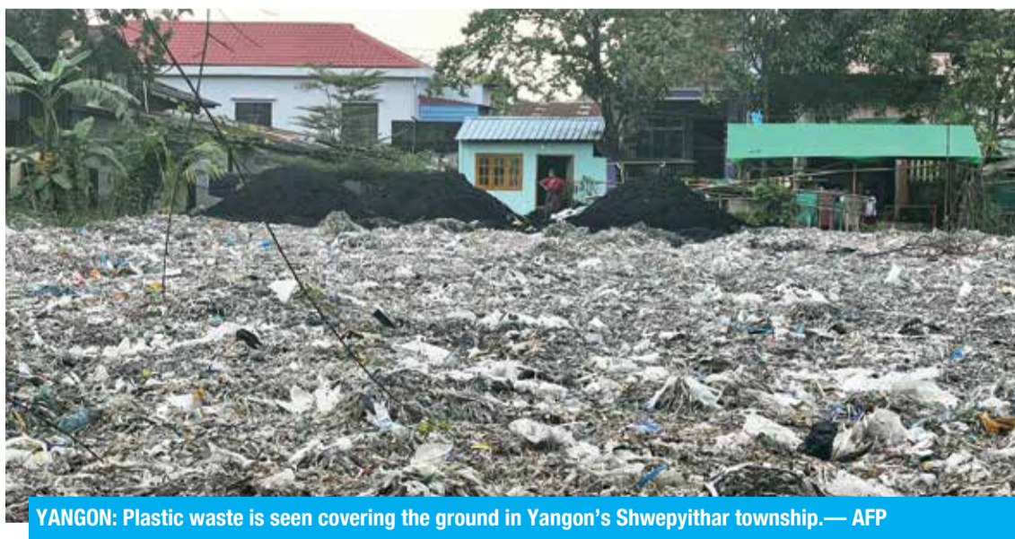
YANGON: Plastic waste is seen covering the ground in Yangon's Shwepyithar township. — AFP

In July Myanmar's junta said there was a $1.639 billion difference between what Thailand said it exported to Myanmar, and what Myanmar said it imported from Thailand. The yawning discrepancy "might be caused by illegal trade", its Illegal Trade Eradication Steering Committee said. — AFP