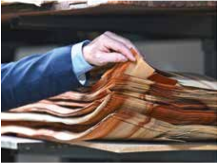
Pieces of wood used to build the "Steinway X Disney: Mickey Mouse Limited Edition" piano are inspected at Steinway & Sons Factory.