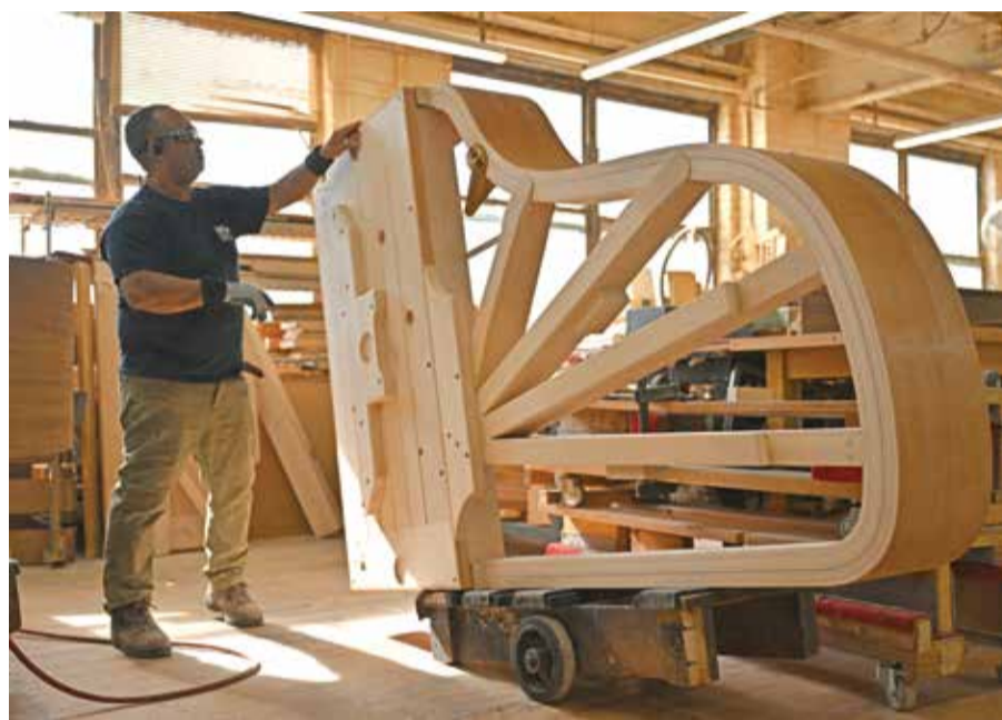
A worker inspects the frame of a "Steinway X Disney: Mickey Mouse Limited Edition" piano at Steinway & Sons Factory.

And recently he introduced a "Steinway X Disney" limited edition piano handpainted with the likeness of Mickey Mouse. Lang Lang said a benefit of partnering with Disney is bringing more classical music to the ears of young people. "A lot of the time people ask me to play 'Frozen,' to play 'Can You Feel The Love Tonight,'" he said, citing themes from the