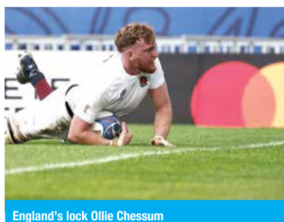
England's lock Ollie Chessum

Despite reaching the last four, England, winners in 2003, have failed to convince many people of their title credentials, underlined by a first loss to Fiji before the tournament. They beat Argentina, Japan, Chile and Samoa clinically during the group stage before gaining revenge over Pacific Islanders Fiji in last weekend's quarter-final. "In the warm-up games at the start, we were in a strange place," Chessum said. "But we are starting to figure ourselves out and find our identity. "We are growing as a team and I think that is a scary thing for any