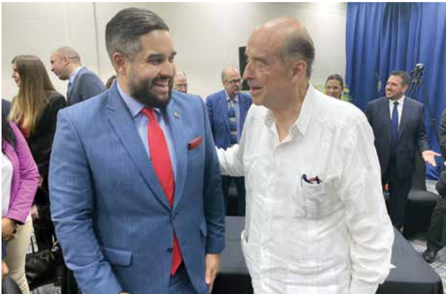
INT JAMES, BARBADOS: Colombia's Minister of Foreign Affairs, Alvaro Leyva (right), talking with Venezuela's deputy of the National Assembly, Nicolas Maduro Guerra, son of Venezuelan President Nicolas Maduro, during a meeting in Barbados. Venezuela's government and opposition will restart talks seeking to end the country's political and economic crisis, after a nearly year-long suspension.

"All who want to run for president should be allowed the opportunity," he said in a statement. The agreement between Washington and Caracas comes just a day after the Venezuelan government and opposition reached a deal in