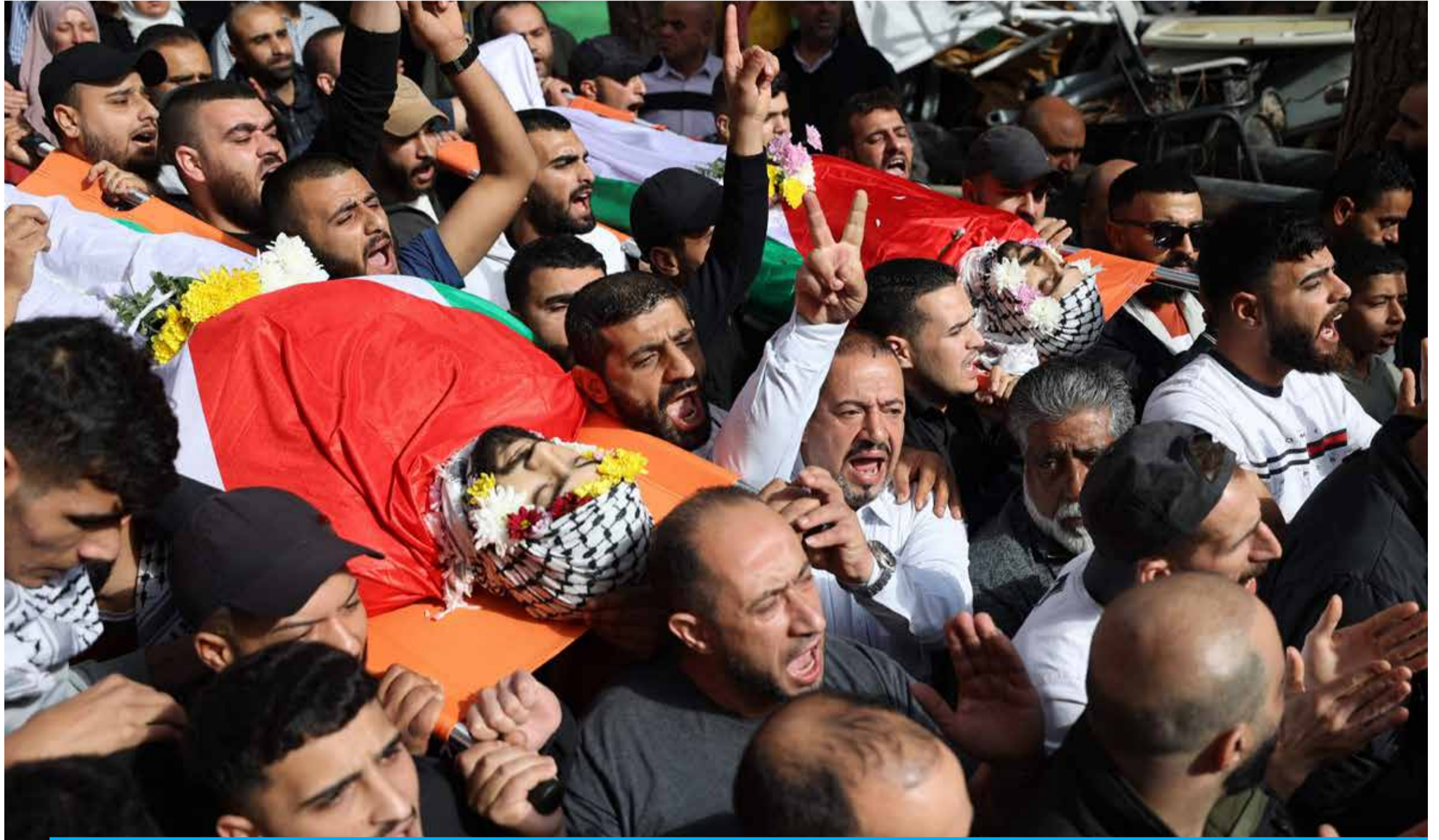
RAMALLAH: Mourners carry the flag-draped bodies of two Palestinian youths killed in confrontations with settlers and Zionist forces the previous night on Oct 19, 2023.