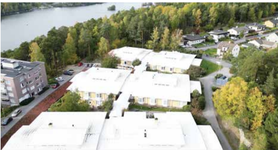
Aerial picture shows the Tallhøiden nursing home in Sodertälje, southwest of Stockholm.

An article published by the Journal of Health Policy Research in 2019 examined the question of fake bus stops. It showed that while the goal was to reduce the number of dementia patients trying to escape from nursing homes, the bus stops could also increase their sense of frustration and the feeling of being deceived. — AFP