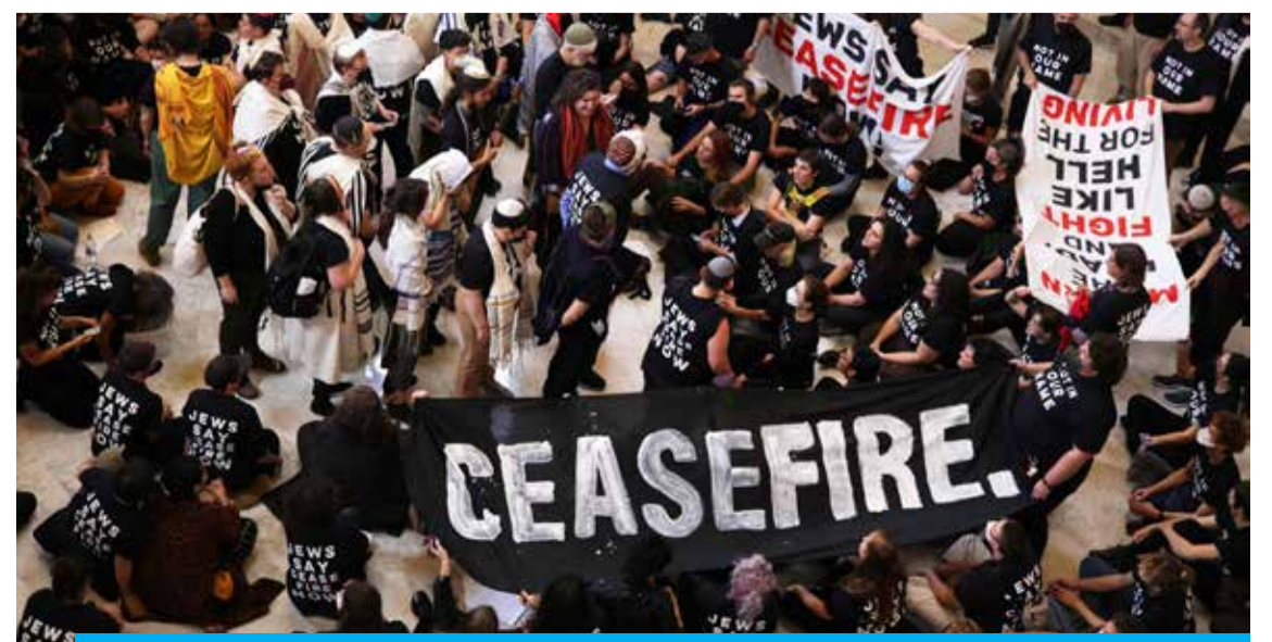
WASHINGTON: Protesters stage a demonstration in support of a ceasefire in Gaza in the Cannon House Office Building on Oct 18, 2023.

In a meeting with UK Foreign Secretary James Cleverly in Cairo on Thursday, Egyptian Foreign Minister Sameh Shoukry discussed "the priority of delivering humanitarian and emergency aid to the people of Gaza", according to the foreign ministry. Sisi also discussed "the situation in Gaza" with US Central Command chief Michael Kurilla, his office said Thursday. Egypt and Jordan were the first Arab states to normalize relations with the Zionist entity, in 1979 and 1994 respectively, and have since been key mediators between Zionist and Palestinian officials.