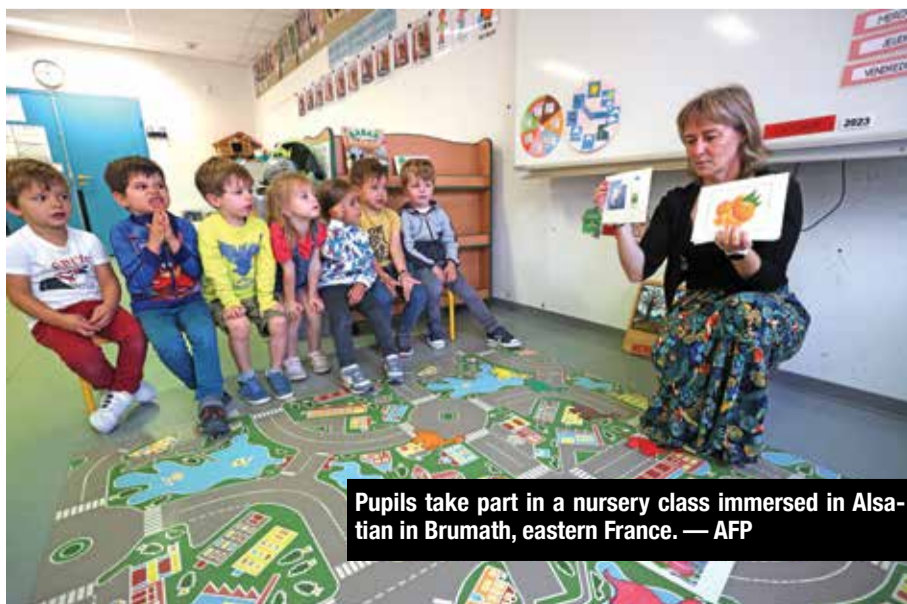
Pupils take part in a nursery class immersed in Alsatian in Brumath, eastern France.