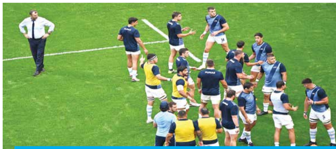
MARSEILLE: Argentina's Australian head coach Michael Cheika (left) watches his players as they warm up ahead of the France 2023 Rugby World Cup quarter-final match between Wales and Argentina at the Stade Velodrome in Marseille.

Fashion and rugby might be at opposite ends of the spectrum, but he says he learnt things from the former which are integral to his coaching philosophy. "It was a total paradox to what I was doing at the weekends," he told AFP with a grin in 2016. "No, I don't think I'd fit into a pair of Victoria Beckham's