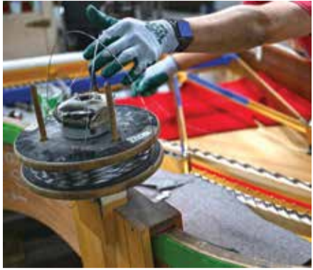
A worker builds the "Steinway X Disney: Mickey Mouse Limited Edition" piano at Steinway & Sons Factory.