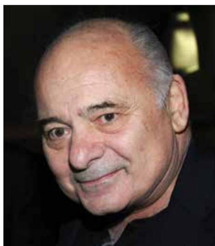
US actor Burt Young attends the Academy of Motion Picture Arts & Sciences' Official New York Oscar Night Party at The Carlyle.