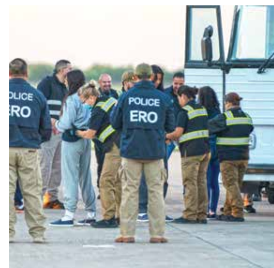
HARLINGEN: A woman in shackles is patted down before boarding the first deportation flight of undocumented Venezuelans in Harlingen, Texas, on Oct 18, 2023.