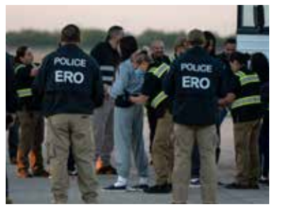
Venezuelan migrants deported on first charter plane from US