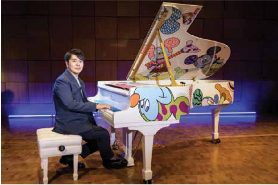
Pianist Lang Lang poses as he performs during the unveiling of the "Steinway x Disney: Mickey Mouse Limited Edition" piano event at Steinway Hall New York.