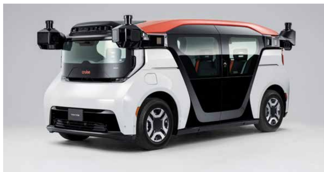
TOKYO: This undated handout photo released by Honda Motor on October 19, 2023 shows Cruise Origin, a driverless vehicle. Japan's Honda and US auto titan General Motors said October 19, 2023 they plan to launch a driverless taxi service in Tokyo in 2026, helping tackle labor shortages in an ageing society.

It will "pick up customers at a specified location and drive them to the destination, entirely