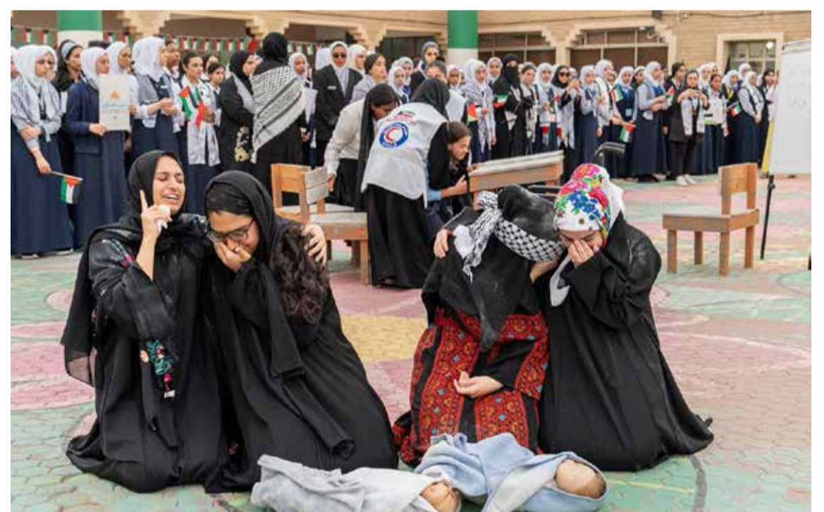
KUWAIT: (Left) Medical staff of Sabah Hospital stand in solidarity with the Palestinian people on Oct 19, 2023. (Right) Students of Mariya Al-Qibtiyya Girls High School hold a presentation on Zionist massacres on Oct 19, 2023.