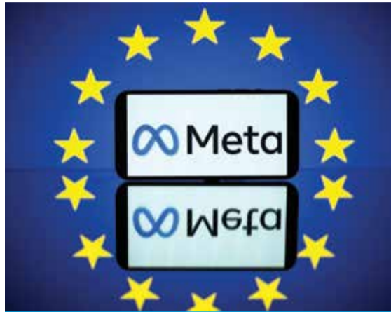
TOULOUSE: File picture shows a screen displaying the Meta logo and the European flag. The EU announced probes on October 19, 2023, into Facebook owner Meta and TikTok, seeking more details on the measures they have taken to stop the spread of "illegal content and disinformation" after the Hamas attack on Zionist entity. — AFP

Commission seeks details about how TikTok was complying with rules on protecting minors online