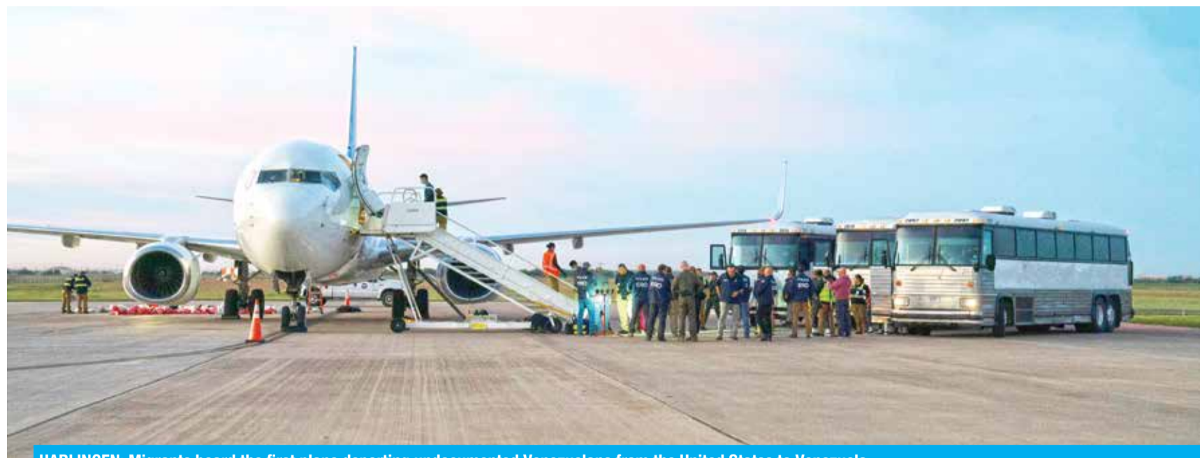
HARLINGEN: Migrants board the first plane departing undocumented Venezuelans from the United States to Venezuela.