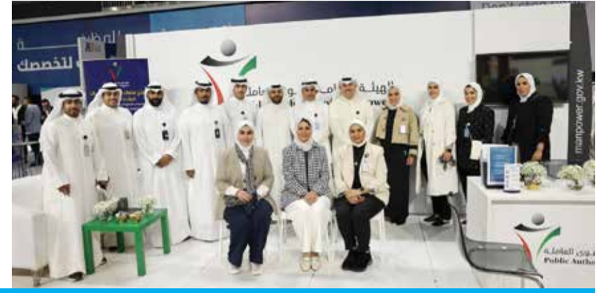
KUWAIT: Participants are pictured during the job fair.

KUWAIT: Minister of Education and Minister of Higher Education and Scientific Research Dr Adel Al-Mane on Thursday encouraged youths to look for job opportunities in the private sector, as they are varied. This came as a remark to reporters on the sidelines of opening the sixth exhibition of job and study opportunities organized by the Public Authority for Applied Education and Training (PAAET) in cooperation with the "my job" fair, with the participation of 120 government agencies.