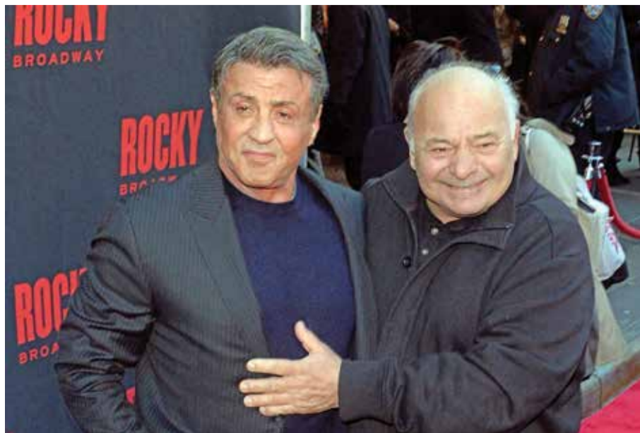
Actors Sylvester Stallone (left) and Burt Young attend the "Rocky" Broadway opening night at the Winter Garden Theatre on March 13, 2014 in New York City.