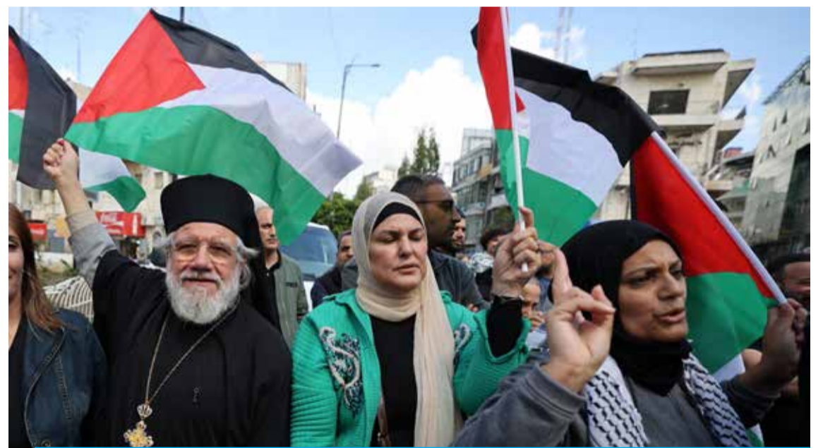
Palestinians demonstrate against the Zionist occupation in the streets of the occupied West Bank city of Ramallah on Oct 19, 2023.

Zionist occupation forces detained Thursday morning 41 Palestinians during a raid at the southern West Bank city of Hebron, and a similar number detained during raids at several towns and villages in the Ramallah governorate, while 50 workers from the Gaza Strip who were kicked out of Zionist-controlled areas and were staying in Dheishah refugee camp in Bethlehem were also rounded up, among