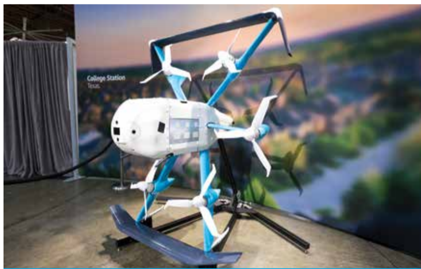
SUMNER: Amazon's new MK30 Prime Air drone is displayed during Amazon's "Delivering the Future" event at the company's BFI Fulfillment Center, Robotics Research and Development Hub in Sumner, Washington.