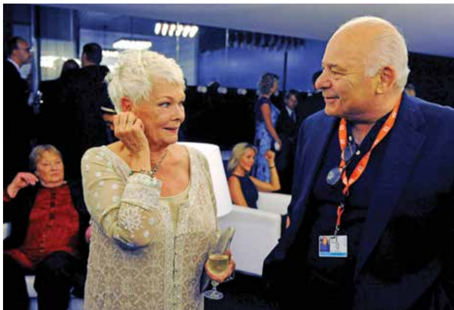
British actress Judi Dench (left) talks with US actor Burt Young during the opening of the 46th Karlovy Vary International Film Festival (KVIFF) in Karlovy Vary, Czech Republic.