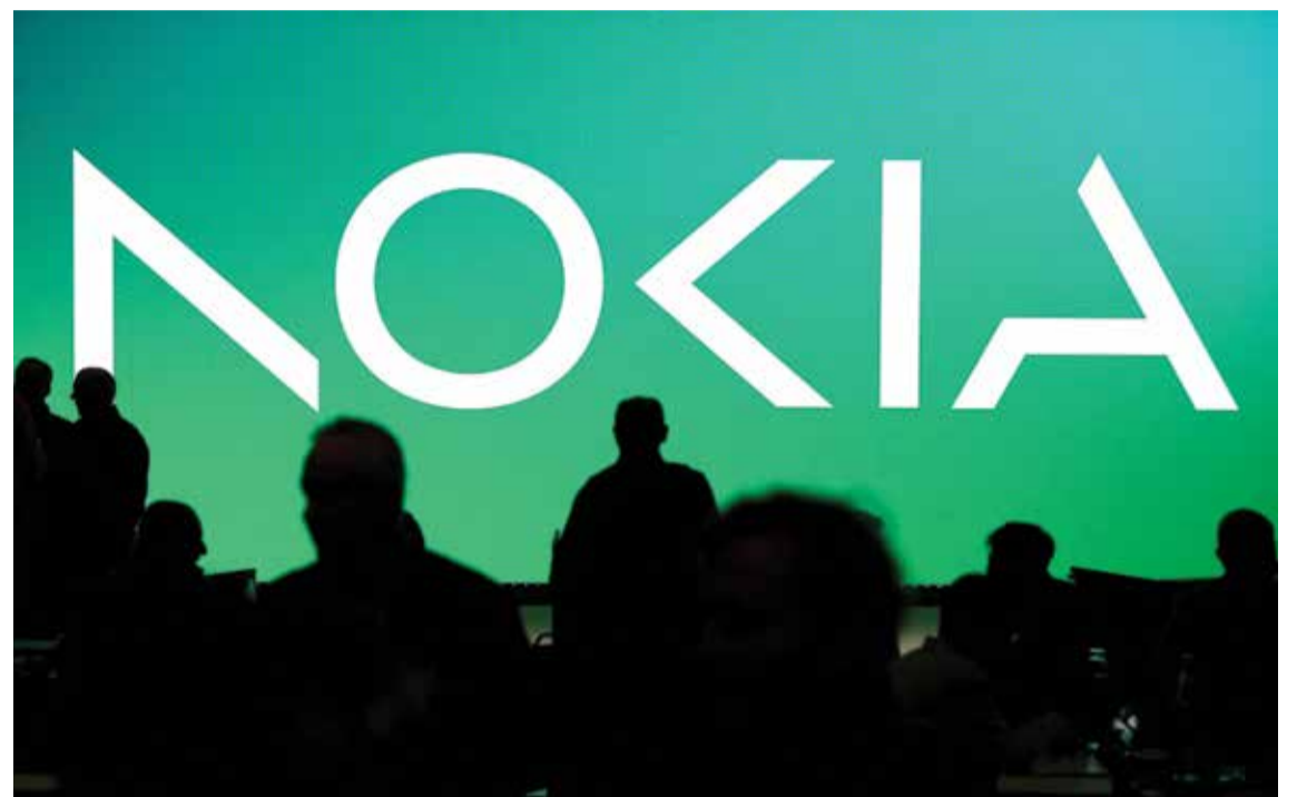
BARCELONA: File picture shows Nokia's new logo at the Mobile World Congress (MWC), the telecom industry's biggest annual gathering, in Barcelona. Nokia said that it would cut up to 14,000 jobs as profits fell on weakening demand for its 5G equipment in North America. — AFP

Nokia's announcement follows tens of thousands of job cuts across the tech sector this year. British telecom group BT said in May that it will axe up to 55,000 jobs by the end of the decade. Tech giants Meta and Microsoft have revealed plans to reduce their workforce by as many as 10,000 employees this year. In January, online retail giant Amazon announced it was cutting over 18,000 jobs worldwide and Google parent company Alphabet announced cuts of around 12,000 people. — AFP