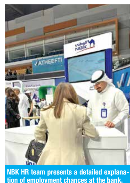
NBK HR team presents a detailed explanation of employment chances at the bank.