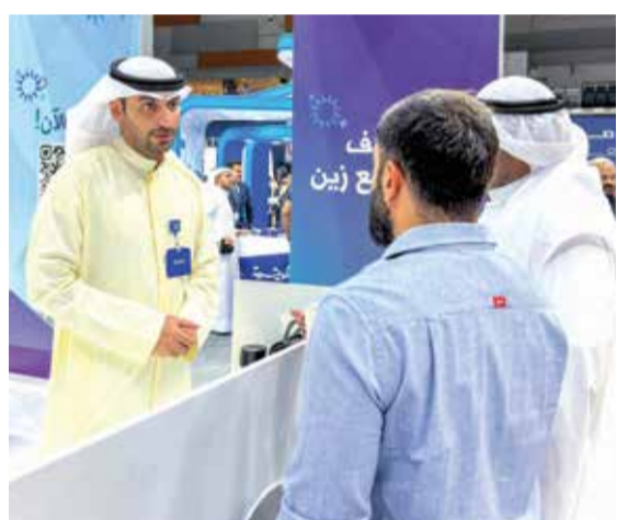
Company keen on attracting national talents.

KUWAIT: Continuing to actively support and participate in career fairs to bolster the national workforce in the private sector, Zain today announces its main sponsorship of the second edition of Watheefti, Kuwait's biggest career gathering. The event is held at the Arena and features over 100 organizations from the local public and private sectors from all industries, and witnesses 60 workshops and panels for students, graduates, and job seekers.