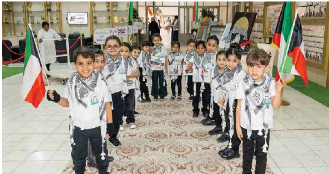
KUWAIT: Schools all over the country stood in solidarity on Thursday with Palestine by raising flags and holding posters during the morning assembly. Students also held up pictures and wore the traditional Palestinian keffiyeh scarf in support of Palestine.

Students told to remove t-shirts featuring Palestinian map