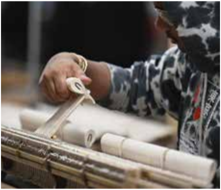
A worker builds the "Steinway X Disney: Mickey Mouse Limited Edition" piano at Steinway & Sons Factory.