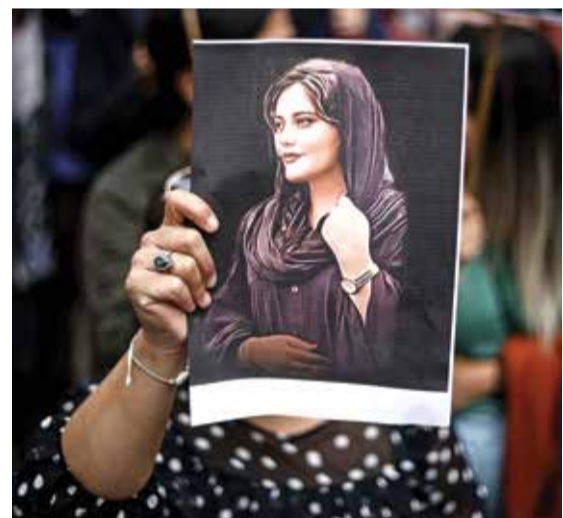
BRUSSELS: A protester holds a portrait of Mahsa Amini during a demonstration in her support in front of the Iranian embassy in this file photo.