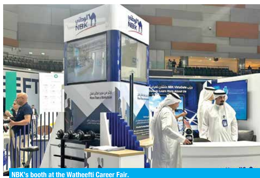
NBK’s booth at the Wathefti Career Fair.

It is worth mentioning that NBK annually sponsors many career fairs for the Kuwaiti youth to introduce to them suitable job opportunities that meet their aspirations, reflecting its constant commitment to nurture the young national talent and qualify them for the labor market. The bank also provides consistent support to all career fairs that help the youth and fresh graduates in finding the right job.