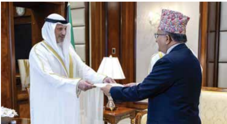
KUWAIT: Kuwait Minister of Foreign Affairs received Ambassador of Nepal Gana Shyam Iamsal, who submitted his credentials as a new ambassador to the country.