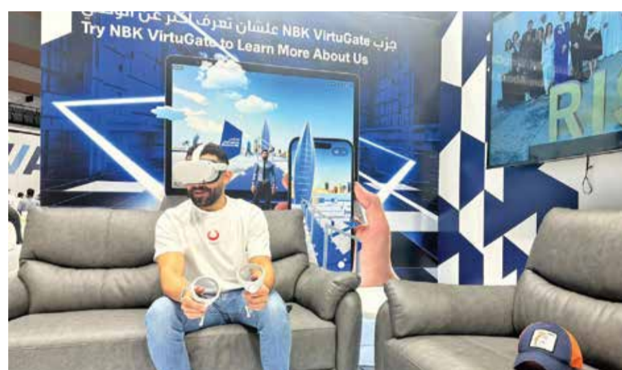
AR technology at NBK’s booth.

ronment fostering cooperation and teamwork among all employees, which is always the main driver of the bank’s successes and high-quality banking services that is comparable to international peers.