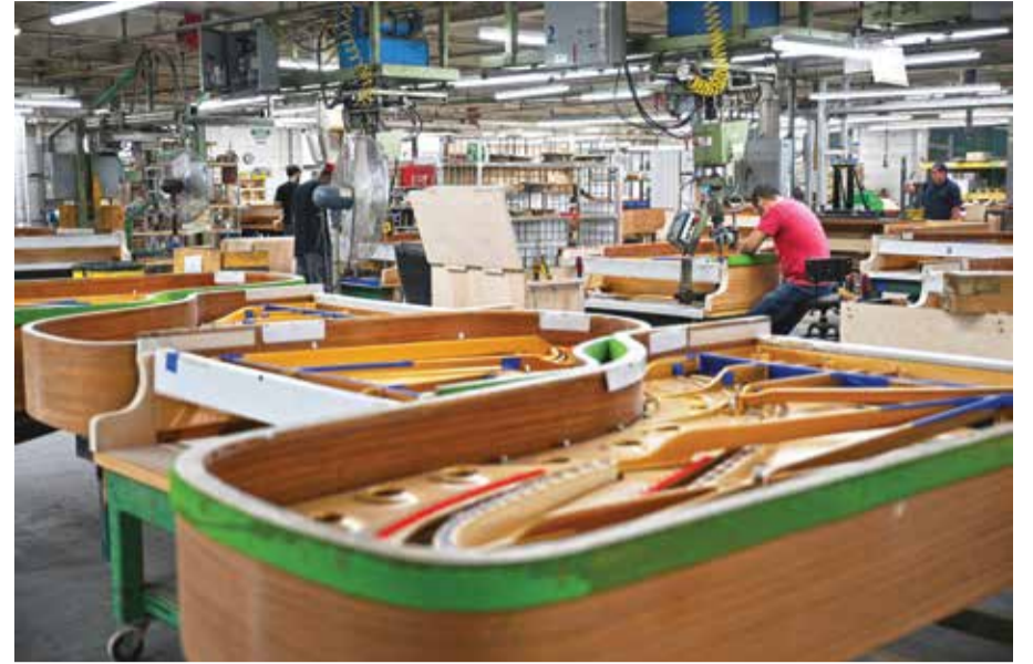
Workers build the "Steinway X Disney: Mickey Mouse Limited Edition" pianos at Steinway & Sons Factory.