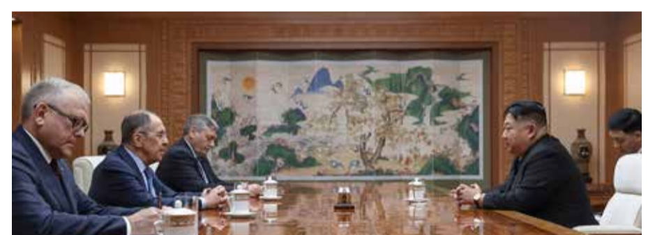
PYONGYANG: This handout picture released by the Russian Foreign Ministry on Oct 19, 2023 shows Russian Foreign Minister Sergei Lavrov meeting with North Korean leader Kim Jong Un.

Lavrov, who laid wreaths at monuments to former North Korean leaders Kim Il Sung and Kim Jong Il in the morning, arrived in