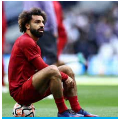
Liverpool's Egyptian striker Mohamed Salah

However, Zionists denied responsibility, claiming the strike was caused by an errant rocket fired by Palestinian militants. A Champions League and Premier