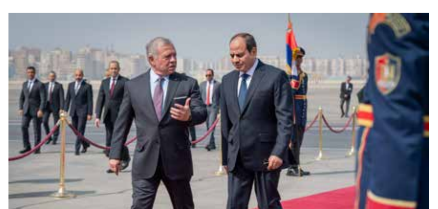
CAIRO: Jordan's King Abdullah II is received by Egypt's President Abdel Fattah Al-Sisi on Oct 19, 2023.

In separate statements issued later, the Egyptian presidency and the royal court said the two leaders "affirmed their unified position rejecting the policy of collective punishment in the siege, starvation or displacement" of Palestinians. The Zionist entity has been carrying out air and artillery strikes on Gaza since Hamas gunmen unleashed a massive attack on Israel on Oct 7 that Zionist officials say killed more than 1,400 people. The Hamas-controlled health ministry says Zionist strikes have killed 3,785 people in the besieged Palestinian enclave, also mostly civilians. Continued on Page 6