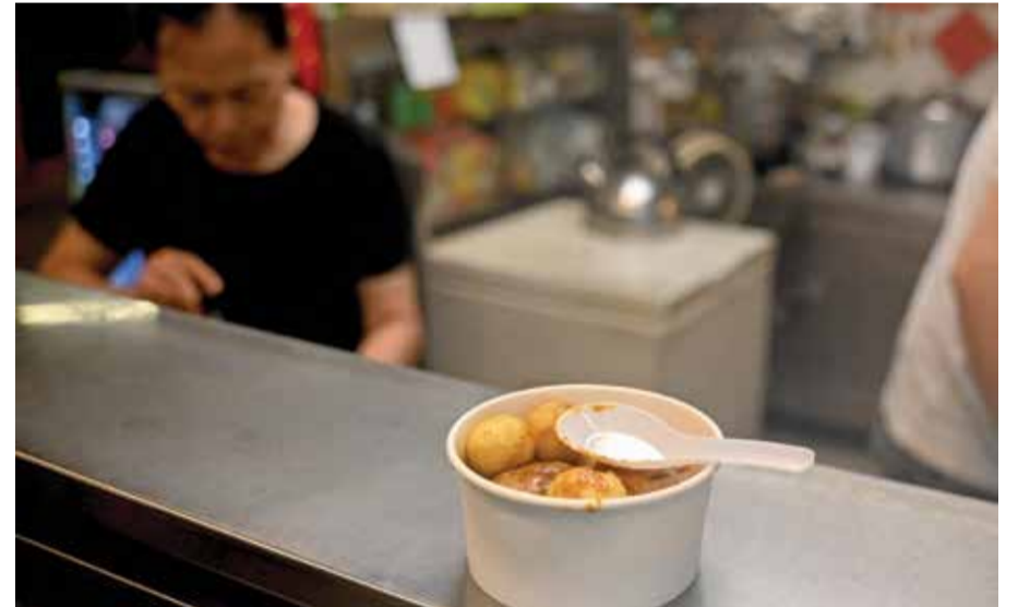
A bowl of Chinese fishballs are served with a plastic spoon at a takeaway counter in Hong Kong.