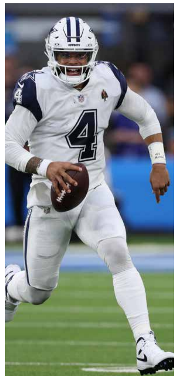
Dak Prescott #4 of the Dallas Cowboys

Aubrey kicked a field goal to put Dallas 10-7 up at the break but Cameron Dicker slotted a 43-yard effort to level for the Chargers at 10-10 heading into