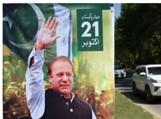
ISLAMABAD: A car drives past a welcoming poster of Pakistan's former prime minister Nawaz Sharif along a street in Islamabad on Oct 19, 2023.

He served less than a year of a seven-year sentence before getting permission to seek medical care in the United Kingdom, ignoring subsequent court