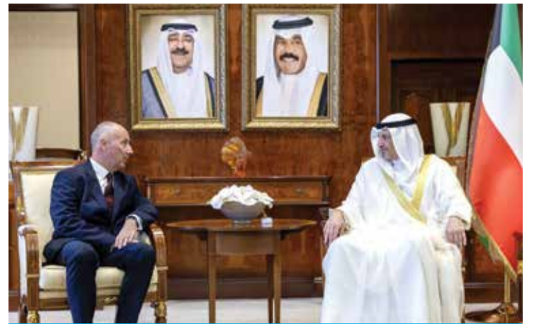
KUWAIT: Kuwait Minister of Foreign Affairs received Ambassador of Hungary Andreas Sabu, who submitted his credentials as a new ambassador to the country.