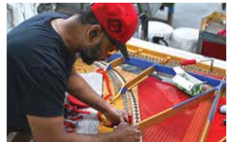
A worker builds the "Steinway X Disney: Mickey Mouse Limited Edition" piano at Steinway & Sons Factory.

ways moves your heart." Asked if he had any concern over AI — whose use in music has been the subject of controversy and debate throughout the industry, with some pointing to copyright abuses — Lang Lang brushed off the concern. "It's not easy to create another Beethoven," he said. — AFP