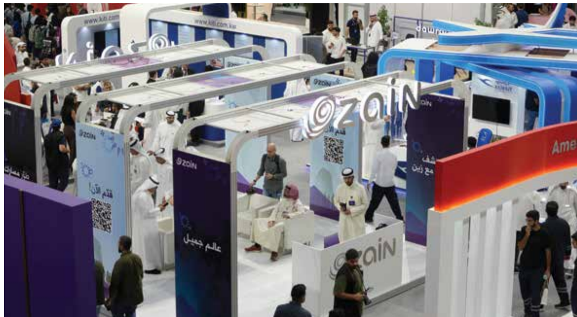
Zain showcases its leading experience in the local telecom sector.