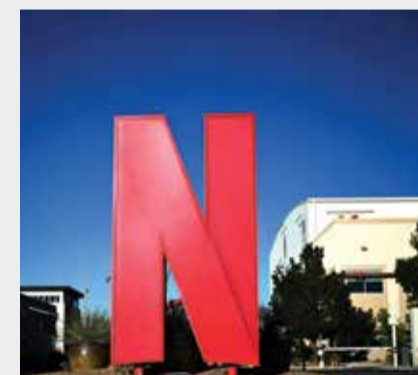
The Netflix logo is displayed at the entrance to Netflix Albuquerque Studios film and television production studio lot in Albuquerque, New Mexico.

To convert non-paying users, Netflix has introduced "borrower" or "shared" accounts, in which subscribers can add extra viewers for a higher price, or transfer viewing profiles to new accounts. In a separate bid for revenue, Netflix launched an ad-subsidized offering around the same time as the crackdown and later eliminated its lowest priced ad-free plan. The ad-supported tier, launched late last year, costs $7.