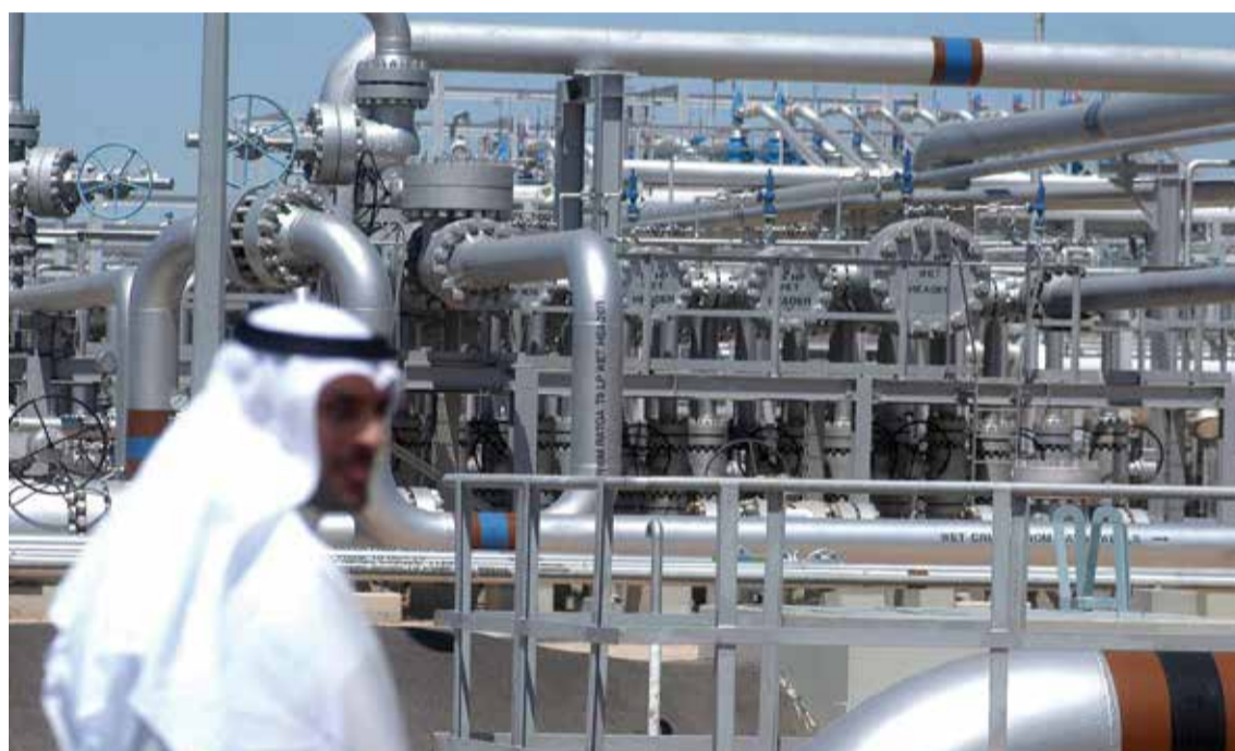
KUWAIT: A worker walks at the Gathering Center 15 (GC 15) oil facility in the northern Al-Rawdhatain oil field, 80 Kms from Kuwait City in this file photo.