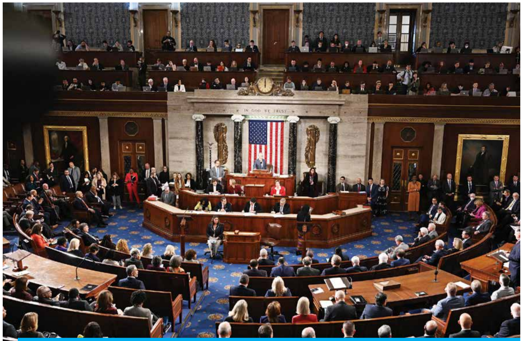
WASHINGTON: A general view shows House of Representatives vote on a new Speaker of the House at the US Capitol on Oct 18, 2023.

His Republican opponents met after voting against him for the first time Tuesday and nearly all reaffirmed their objections, with some predicting Jordan would only hemorrhage more support. The Ohio lawmaker has little of the goodwill among the rank-and-file that his predecessor