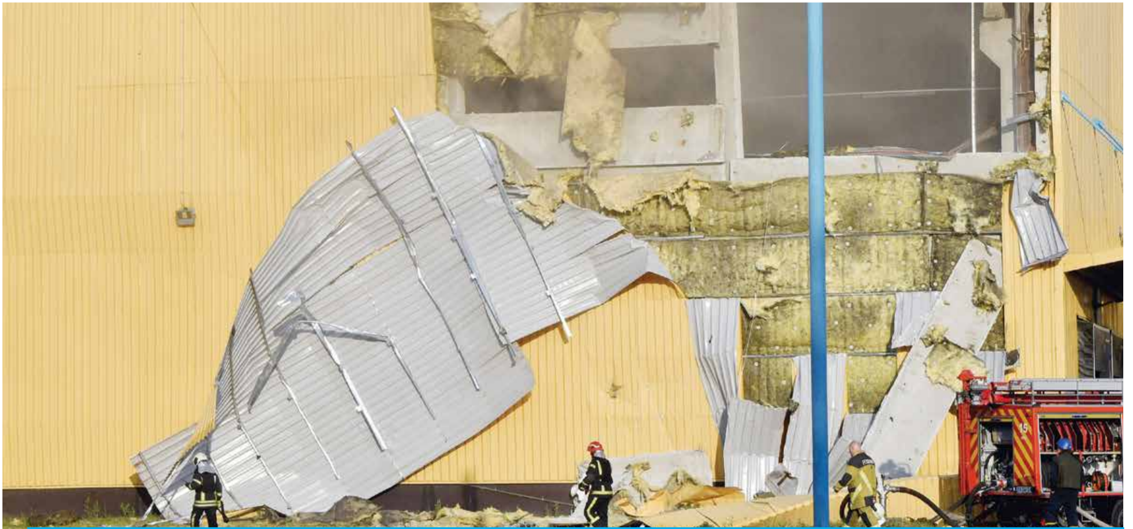
KYIV: Rescuers put out the fire in an industrial facility after a massive Russian drone strike mainly targeting the Ukrainian capital, in Kyiv, on May 28, 2023.