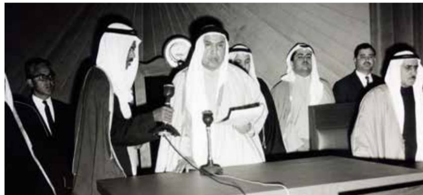
The late Amir Sheikh Abdullah Al-Salem Al-Jaber Al-Sabah gives a speech in this archive photo.