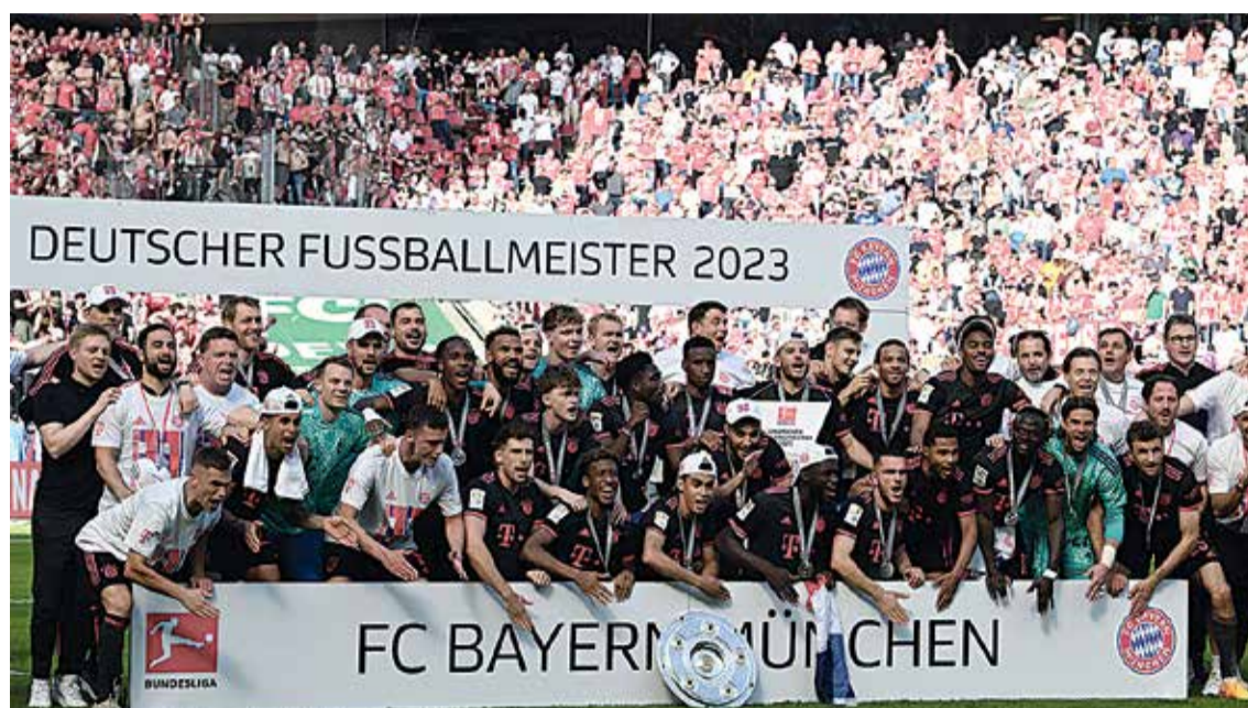
MUNICH: Bayern Munich's players celebrate with the trophy after the German first division Bundesliga football match between FC Cologne and FC Bayern Munich in Cologne, western Germany on May 27, 2023.

Haaland eventually went to Man City and Bayern brought in Sadio Mane from Liverpool. Mane,