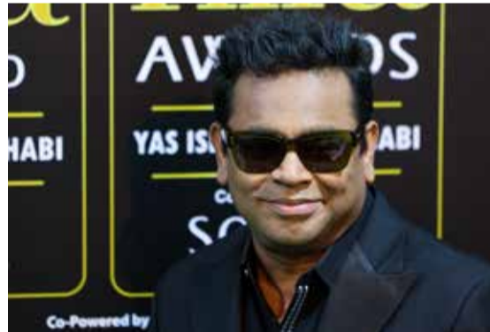
Bollywood music composer/singer AR Rahman.