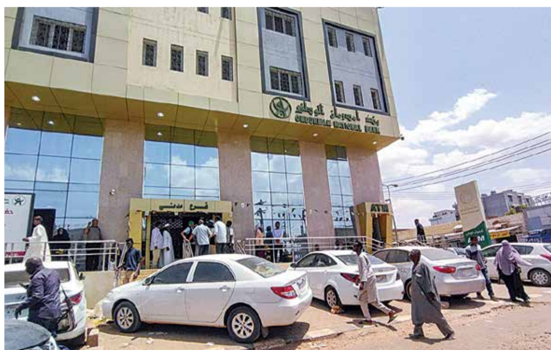
WAD MADANI: People queue at the entrance of an open bank branch in Wad Madani, the capital of Sudan's Al-Jazirah state, on May 28, 2023, as fighting between two rival generals persists.

The 20 articles of impeachment against Paxton were for corruption, misuse of public funds, unfitness for office and obstruction of justice. The indictment alleged that Paxton pressured his staff to protect a friend and donor from prosecution.