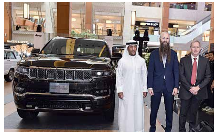
KUWAIT: Al Mulla Group recently celebrated the opening of its 'Second Al Mulla Auto Show' extending over ten days at the 360 Kuwait.

Al Mulla International Auto Trading Company, a member of Al Mulla Group and the sole authorized distributor of ACURA vehicles in Kuwait, presents its esteemed customers with exceptional deals as it