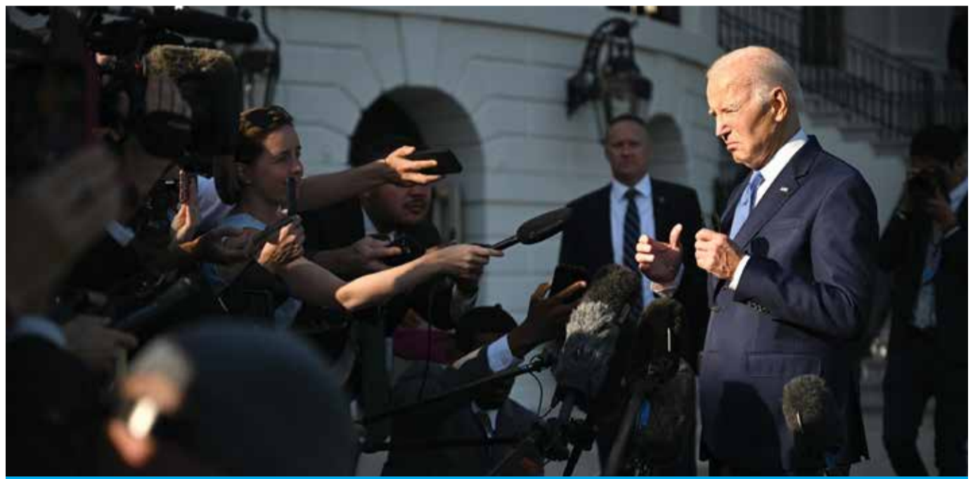
WASHINGTON: US President Joe Biden speaks with reporters before departing from the South Lawn of the White House on Marine One in Washington, DC.

Under House rules, lawmakers have to be given 72 hours before voting once a bill is presented. And if it passes the House, it will then have to go through the Senate, where Democrats hold the majority.