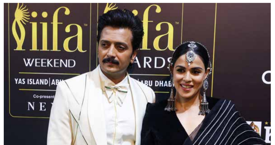
Bollywood actor Ritesh Deshmukh (left) and his wife actress Genelia Deshmukh.

for best song, a first for a film from the country. "What does IIFA mean for (Indian) cinema? I think opening up to the global stage and also bringing us to the global stage as well, so it's exciting both ways," said actress Jacqueline Fernandez, wearing an Arab-inspired head covering.