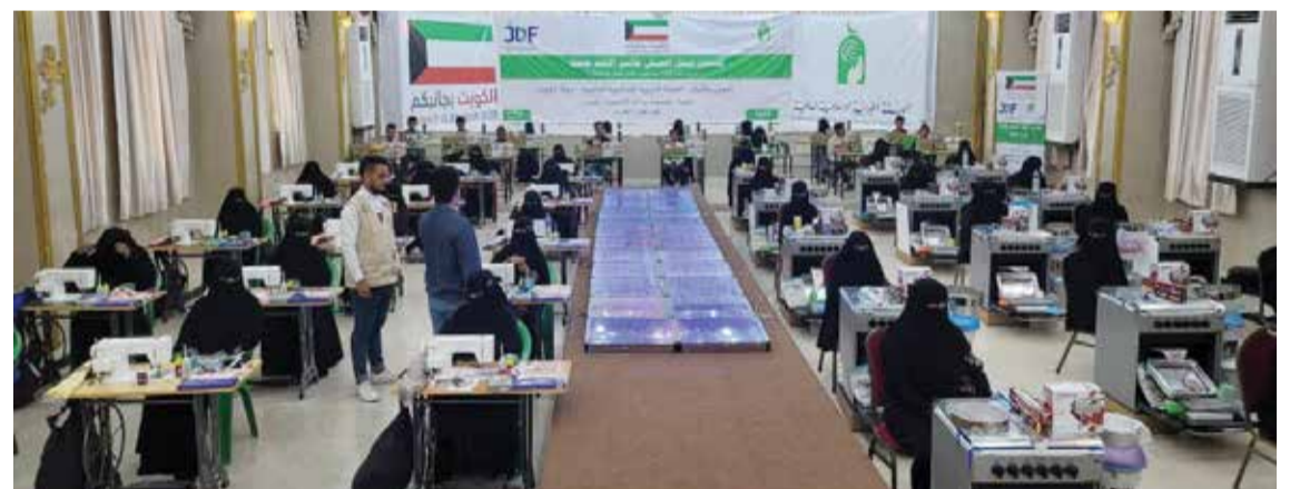
KUWAIT: Women receive training in skills needed for running small businesses that will enable them to sustain themselves and their families.