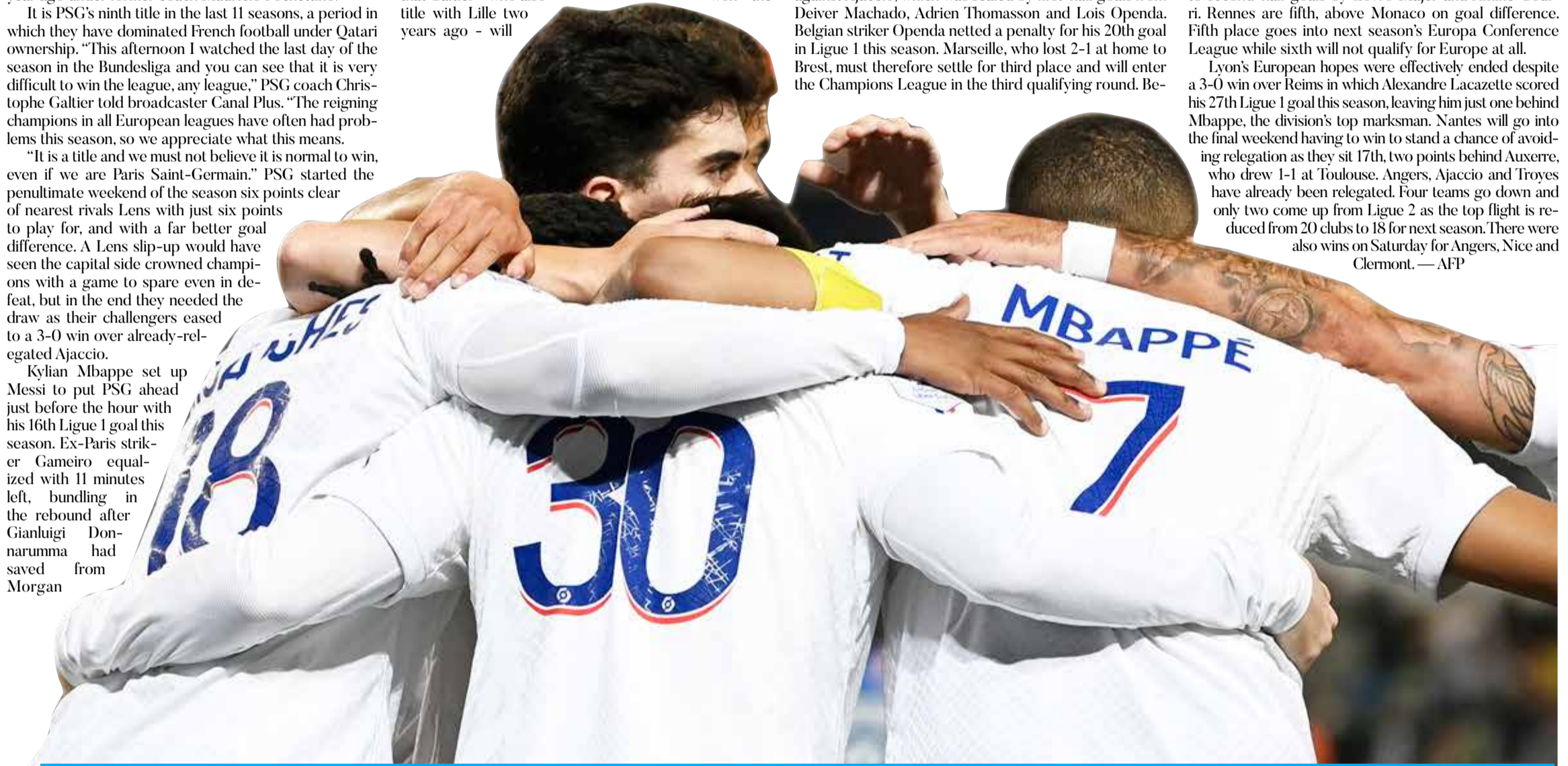
STRASBOURG: Paris Saint-Germain's Argentine forward Lionel Messi (#30) celebrates with Paris Saint-Germain's French forward Kylian Mbappe (#7), Paris Saint-Germain's Portuguese midfielder Vitorinha (up) and teammates after scoring a goal during the French L1 football match between RC Strasbourg Alsace and Paris Saint-Germain (PSG) on May 27, 2023.

Lyon's European hopes were effectively ended despite a 3-0 win over Reims in which Alexandre Lacazette scored his 27th Ligue 1 goal this season, leaving him just one behind Mbappe, the division's top marksman. Nantes will go into the final weekend having to win to stand a chance of avoiding relegation as they sit 17th, two points behind Auxerre, who drew 1-1 at Toulouse. Angers, Ajaccio and Troyes have already been relegated. Four teams go down and only two come up from Ligue 2 as the top flight is reduced from 20 clubs to 18 for next season. There were also wins on Saturday for Angers, Nice and Clermont.