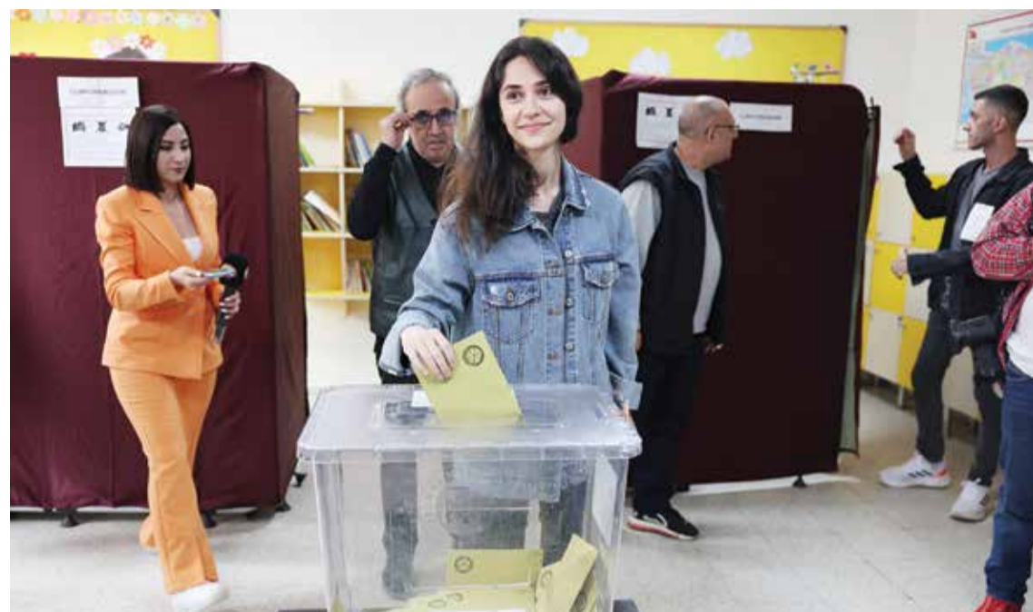
ANKARA: A voter casts her ballot at a polling station during the presidential runoff vote in Ankara on May 28, 2023.