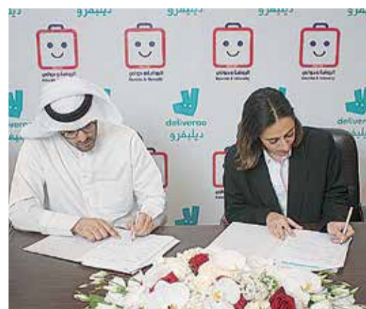
KUWAIT: Deliveroo and Al-Rawda & Hawally Co-Op officials sign partnership deal.

With thousands of grocery products available, Deliveroo is here to deliver the groceries customers need in a fraction of the time it would take to visit a grocery store. Since its launch, Deliveroo has set itself apart with its unbeatable customer service, a wide selection of global & local restaurants, and consistently reliable delivery. To shop at Al-Rawda & Hawally Co-Op through Deliveroo, customers can simply search for "Grocery" tab in the app.