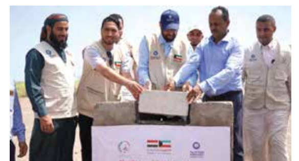
The Najat Charity delegation lays the foundation stone for two Kuwait-funded villages in Taiz.

For one month, the families received, in addition to training, psychological and social support and were taught how to manage small projects. The training, which involved using sewing machines, mobile phone maintenance and making confectionary products, will help the families start projects, enabling them to sustain themselves and improve their quality of life. — KUNA