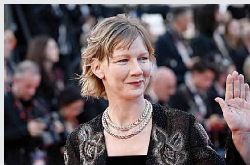
German actress Sandra Hueller arrives for the Closing Ceremony and the screening of the film "Elemental" during the 76th edition of the Cannes Film Festival in Cannes, southern France.