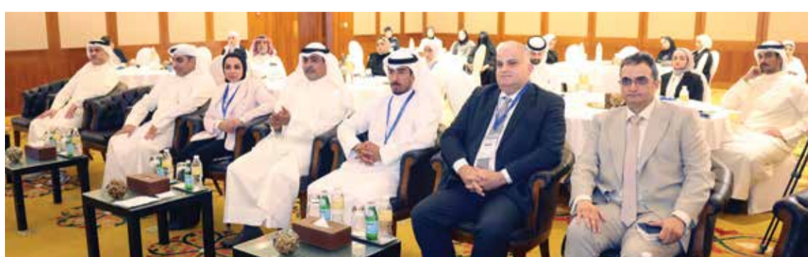
KUWAIT: Guest speakers, seen in this photo, discussed the relationship between law and development.