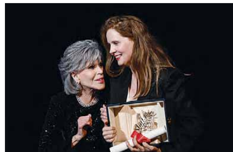
French director Justine Triet (right) celebrates on stage with US actress Jane Fonda after she won the Palme d'Or.