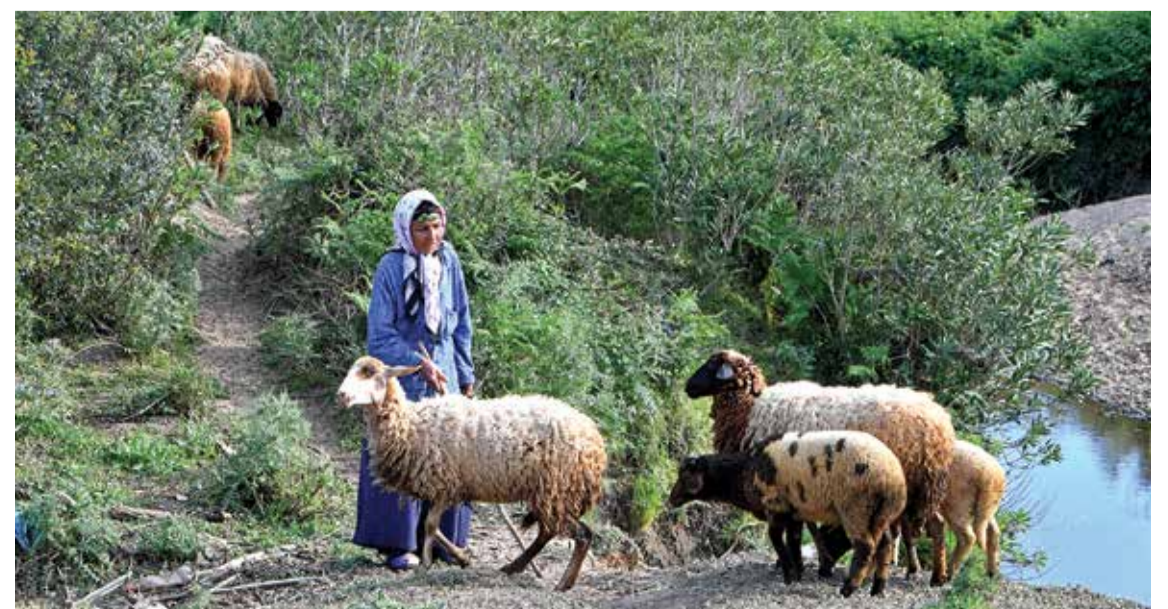
CAP NEGRO: A woman grazes sheep in Cap Negro in northern Tunisia.