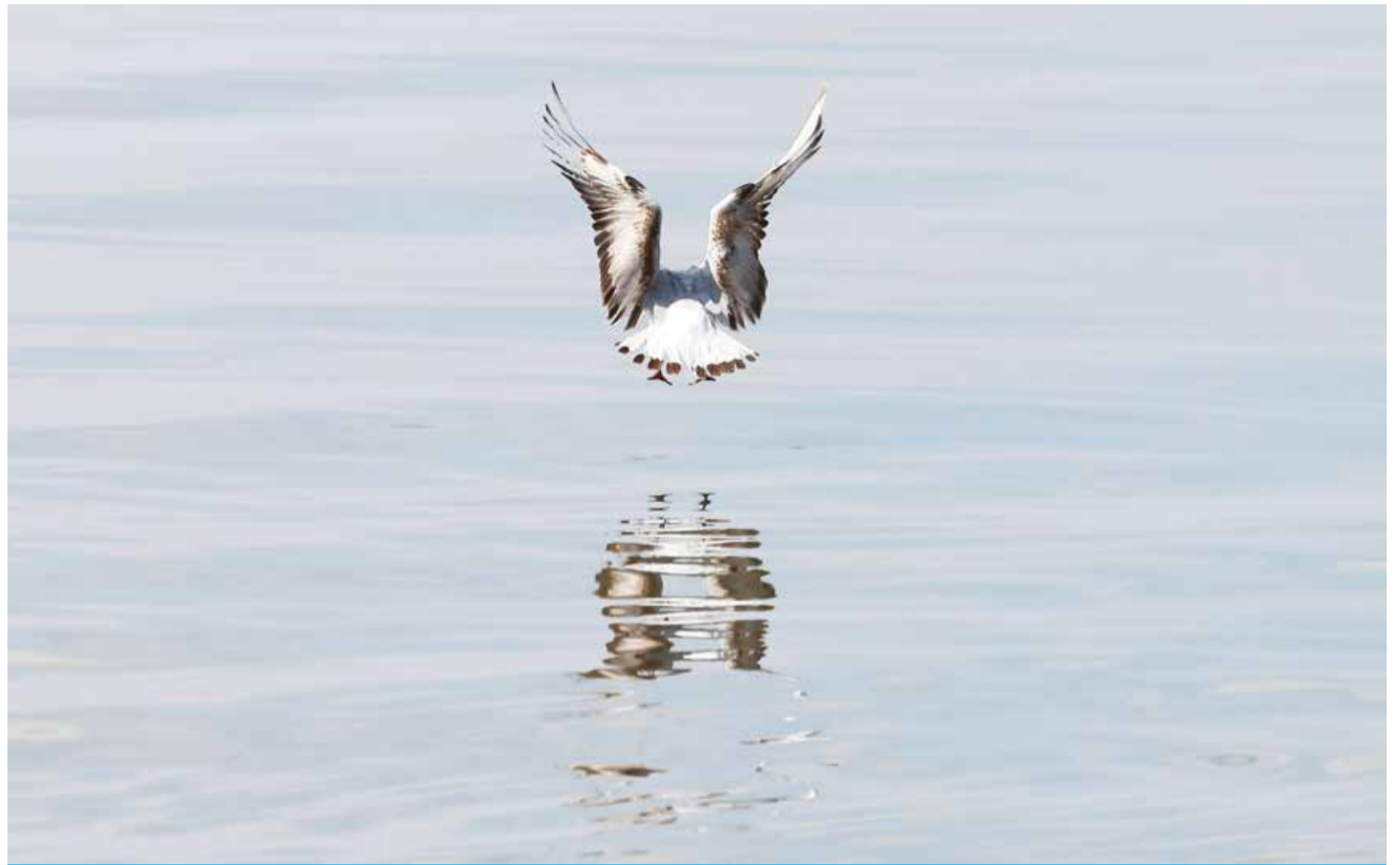
KUWAIT: A seagull flies over the waters of the Arabian Gulf in Kuwait City.