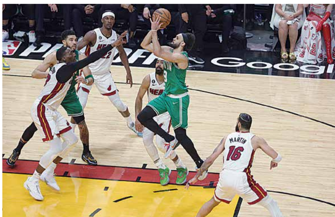
MIAMI: Derrick White #9 of the Boston Celtics drives to the basket ahead of Bam Adebayo #13 of the Miami Heat during the fourth quarter in game six of the Eastern Conference Finals on May 27, 2023.

But the Celtics responded strongly with a 16-5 run before the late drama began to unfold, with Butler scoring 10 points to give Miami the lead with three seconds to go. Butler was philosophical in defeat. "That's basketball for you. Basketball at its finest. Very, very, very entertaining," he said. "We can do it. I know that we will do it. We've got to go on the road and win in a very, very, very tough environment. But we are capable of it. So let's get busy."