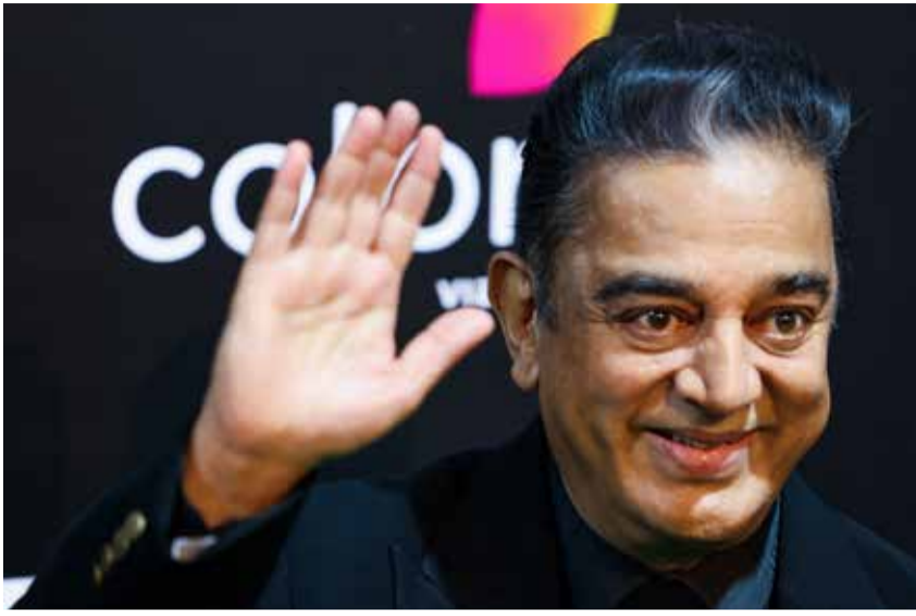
Bollywood actor Kamal Haasan arrives for the 23rd edition of the International Indian Film Academy (IIFA) Awards in Abu Dhabi. — AFP photos