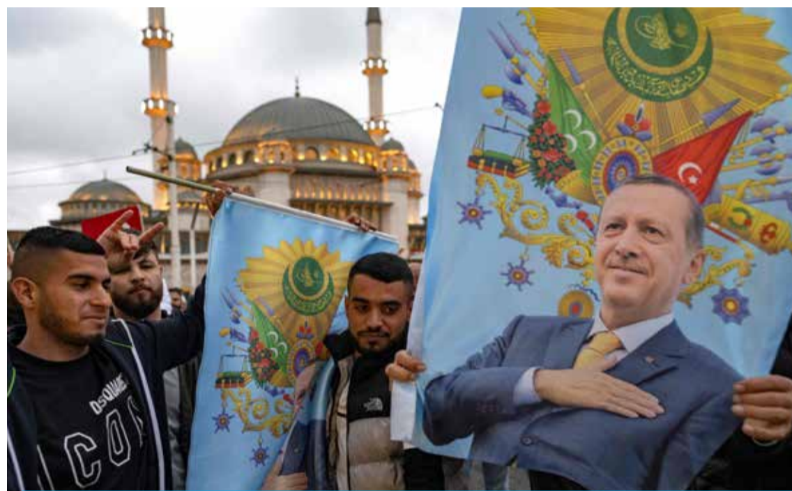
ISTANBUL: Supporters of Turkish President Recep Tayyip Erdogan celebrate near Taksim Mosque in Taksim Square on May 28, 2023 after Erdogan declared victory in a historic runoff election.

President wins historic runoff • Main cities erupt in jubilation