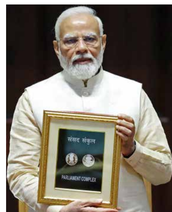
NEW DELHI: India's Prime Minister Narendra Modi releases a 75-rupee coin to commemorate the opening of the new parliament building on May 28, 2023.

But Amit Malviya, who heads the BJP's social media campaign, pointed to the 1927 inauguration of the old parliament building by the British viceroy and attended by Gandhi's great-great-grandfather Motilal Nehru. "The Congress, which then had no compunc-