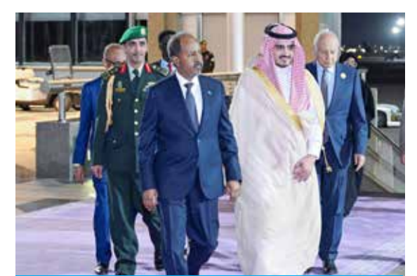
JEDDAH: File photo shows Deputy Amir of Makkah Prince Badr bin Sultan bin Abdulaziz (right) welcoming Somalia's President Hassan Sheikh Mohamud (left) upon his arrival in Jeddah to take part in the Arab League Summit.

The agreement for nationwide universal suffrage was reached after four days of meetings by the National Consultative Forum, which included Mohamud, Prime Minister Hamza Abdi Barre and federal state leaders. But Puntland's state president Said Abdullahi Deni did not attend the meeting as the region voted.