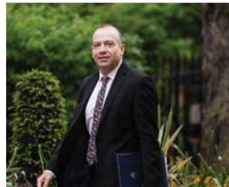
LONDON: Britain's Northern Ireland Secretary Chris Heaton-Harris arrives for a cabinet meeting at 10 Downing Street in central London.