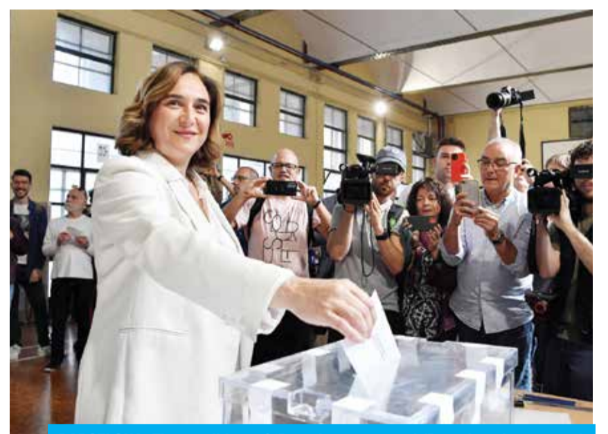
BARCELONA: The candidate of ‘Barcelona en comu’ (Barcelona in common) for her re-election as Mayor of Barcelona, Ada Colau, casts her ballot at a polling station in La Sedeta high school, in Barcelona on May 28, 2023 during local and regional polls.

The number of regions the PP manages to wrest from the Socialists will be important in determining public perceptions of whether Feijoo has won this first round — and whether his victory in the year-end general election is