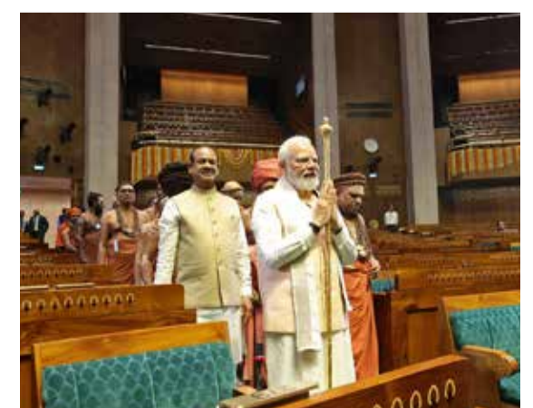
NEW DELHI: India's Prime Minister Narendra Modi gestures during the inauguration of the new parliament building on May 28, 2023.