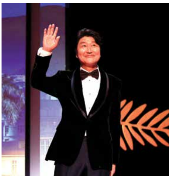
South Korean actor Song Kang-ho arrives on stage to deliver the Best Actress Prize during the closing ceremony of the 76th edition of the Cannes Film Festival in Cannes.

Set during the authoritarian days of 1970s South Korea, "Cobweb" shows the director struggling to manage the chaos of angry producers, hysterical actors and over-bearing censors. Song said he didn't have to look far for motivation. "Maybe I've never been on a film set quite like this," he said, laughing, "But I've certainly had some similar psychological panic — it's not just me, anyone in the industry knows it."