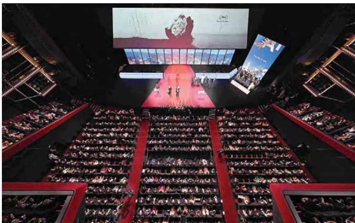
French director Justine Triet (front) celebrates on stage after she won the Palme d'Or.

Though Hueller did not win an award — Cannes traditionally only gives one prize per film — she was arguably the big winner on the night since she also starred in "The Zone of Interest" by Britain's Jonathan Glazer, which took the runner-up Grand Prix. The harrowing and unique look at the private life of a Nazi family at the Auschwitz concentration camp never shows the horrors of the camp directly, leaving them implied by disturbing background noises and small visual details. Hueller chillingly portrays the wife of the Nazi commandant, happily tending her garden and boasting she is "the queen of Auschwitz".