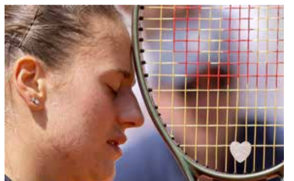
PARIS: Ukraine's Marta Kostyuk reacts after losing against Belarus' Aryna Sabalenka at the end of their women's singles match on day one of the Roland-Garros Open tennis tournament on May 28, 2023.

This year sees a new era at the French Open where for the first time since 2004 Rafael Nadal will not grace the famous red clay. Injured Nadal, the 14-time champion, sits out the 2023 edition of a tournament where he has lost just three of 115 matches. In his absence, Novak Djokovic, a two-time winner, and the man responsible for two of Nadal's three career losses in Paris, will look to edge ahead of the Span-