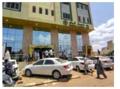
Sudan army chief asks UN to dismiss envoy