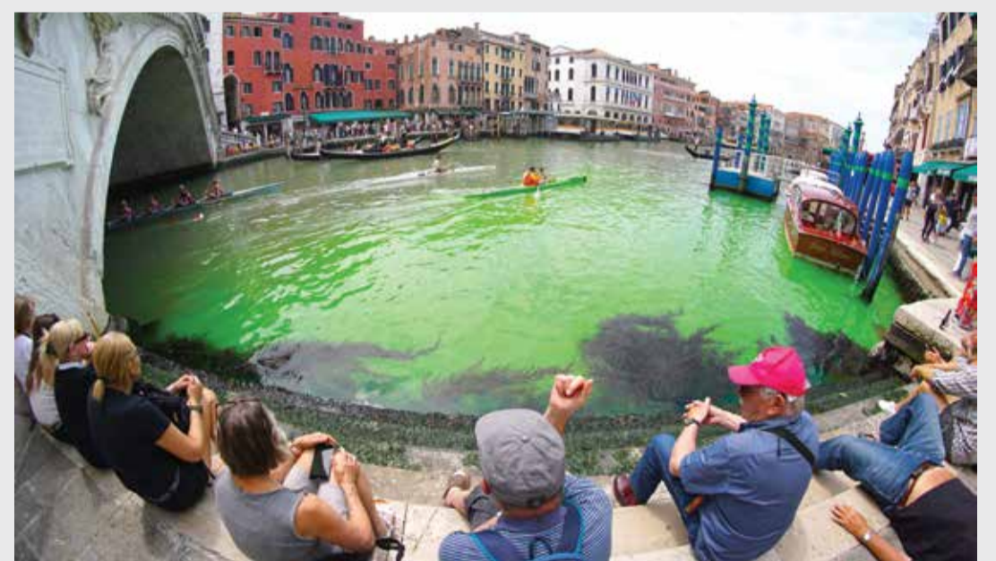
A photo taken and made available by Italian news agency Ansa shows fluorescent green waters below the Rialto Bridge in Venice's Grand Canal.