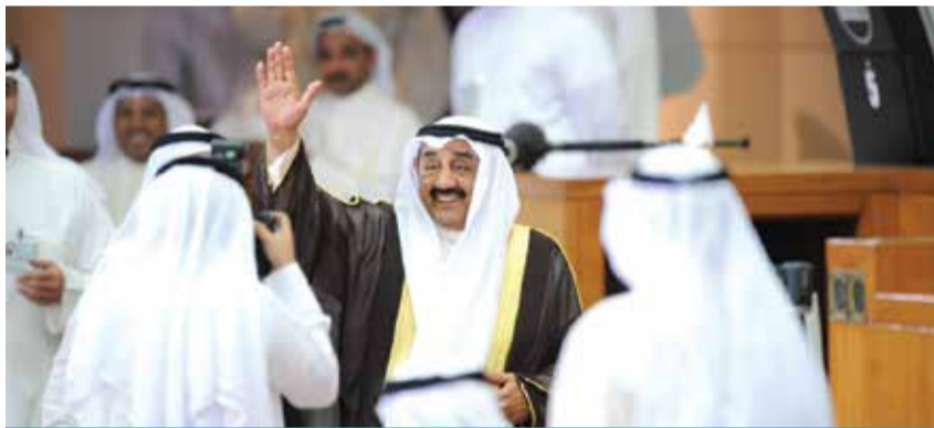
The late Jassem Al-Kharafi, who served as speaker of the parliament from 1999 to 2011, is seen when he was unanimously elected as speaker by all members of the parliament in 2009.

He pointed out the importance of resorting the motivating participation in the elections, overcoming negative criticism, and broadcasting positive messages calling for optimism.