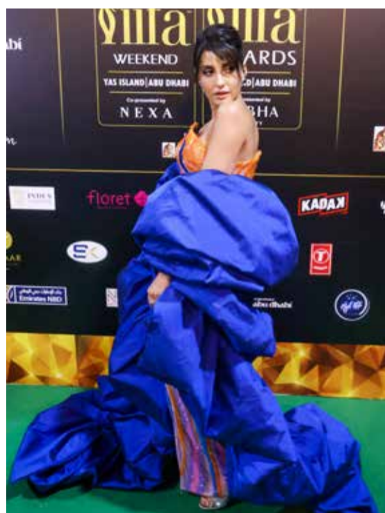
Bollywood actress Nora Fatehi

The rise in streaming services, competition from other parts of India and demand for meatier fare than Bollywood's trademark song-and-dance routines have all contributed to the slump, experts say. However, superstar Shah Rukh Khan's