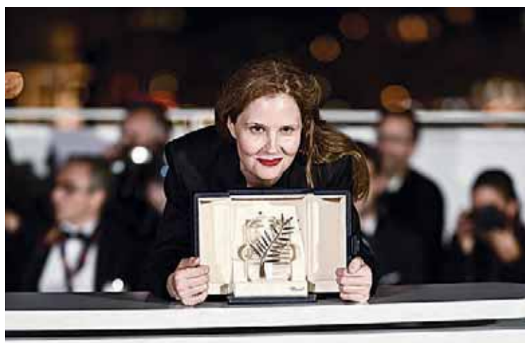
French director Justine Triet poses with her trophy during a photocall after she won the Palme d'Or for the film "Anatomie d'une Chute" (Anatomy of a Fall) during the closing ceremony of the 76th edition of the Cannes Film Festival in Cannes, southern France.