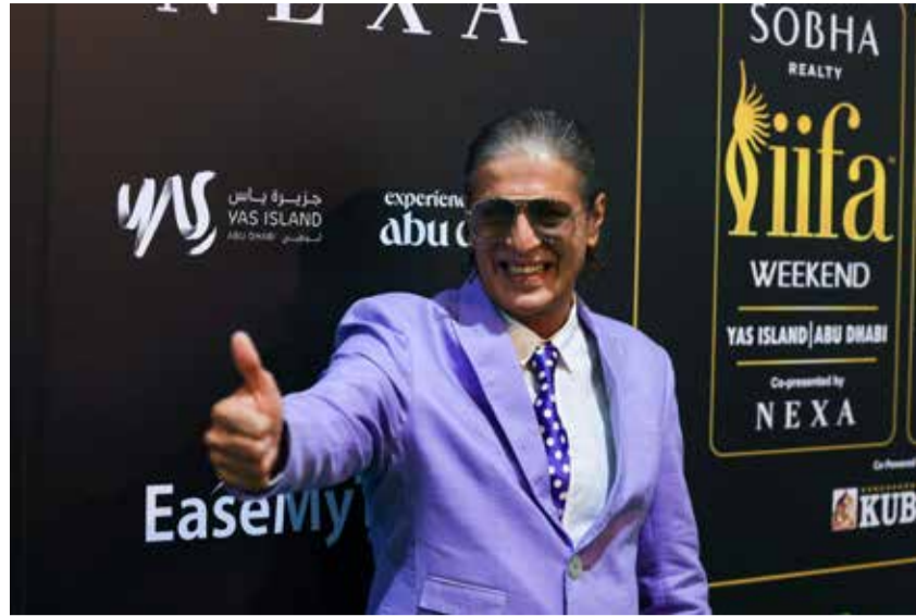
Bollywood actor Chunky Panday arrives for the 23rd edition of the International Indian Film Academy (IIFA) Awards.