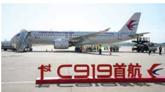
SHANGHAI: China's first domestically produced passenger jet C919 sits on the tarmac before its first commercial flight from Shanghai to Beijing, in Shanghai Hongqiao Airport on May 28, 2023.