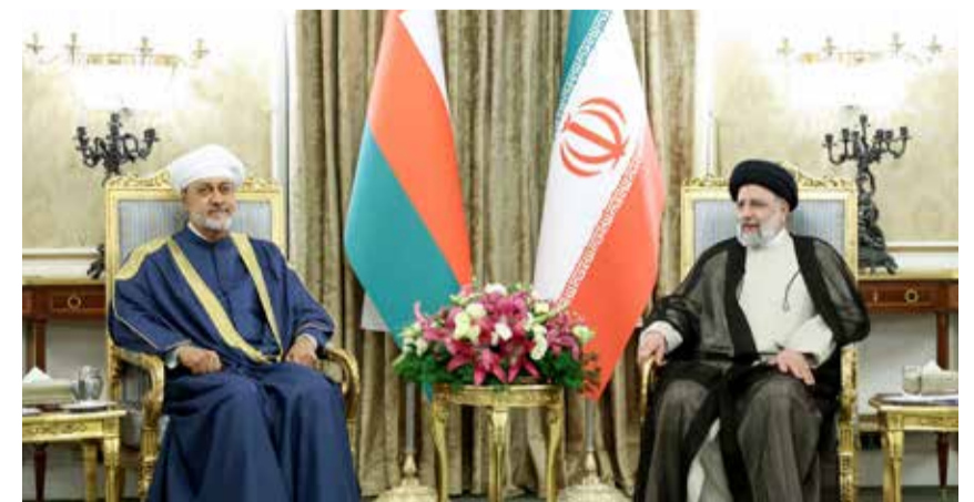
TEHRAN: Iran's President Ebrahim Raisi meets Oman's Sultan Haitham bin Tariq Al-Said on May 28, 2023.

The Omani leader's visit comes a year after Raisi visited Muscat, and follows a China-brokered rapprochement deal between Saudi Arabia and Iran announced in March. Busaidi said Oman was optimistic the sultan's "historic" trip to Iran would be "beneficial