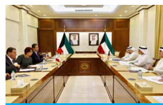
Kuwaiti and Mexican officials discuss common interests and regional and international developments.

KUWAIT: Kuwaiti Deputy Foreign Minister Ambassador Mansour Al-Otaibi met on Sunday with visiting Mexican counterpart Carmen Moreno Toscano. During the meeting, both sides discussed bilateral ties, issues of common interests and latest regional and international developments. After the meeting, both sides signed an agreement of cooperation between the Kuwaiti National Council for Culture, Arts and Letters and the Mexican Secretariat of Culture. — KUNA