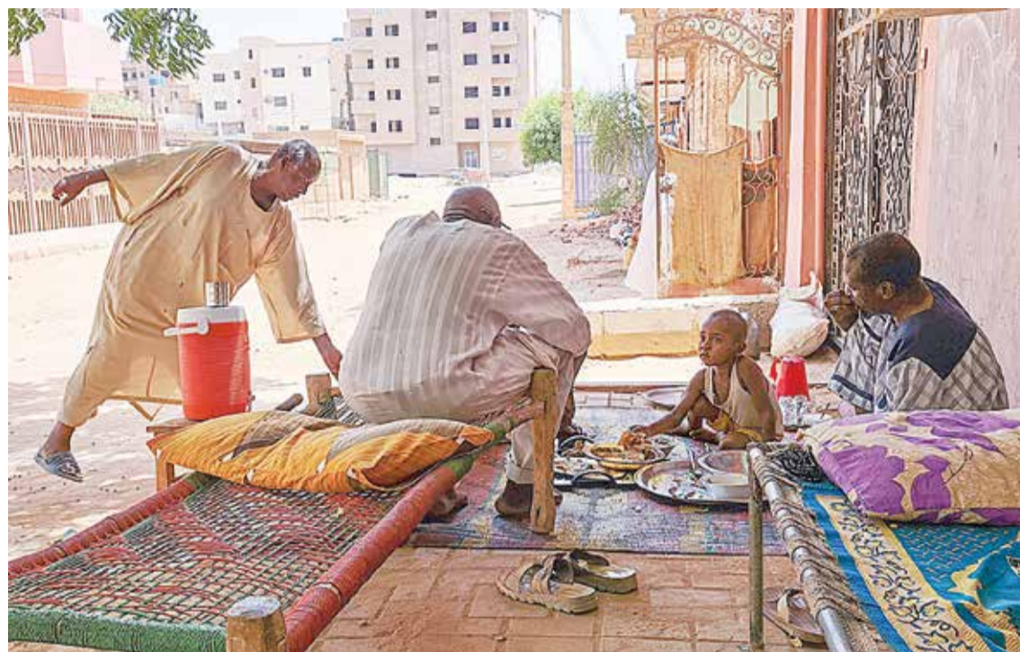
KHARTOUM: People have a meal outside in Khartoum's Jabra neighborhood, on May 28, 2023, as fighting between two rival generals persists.