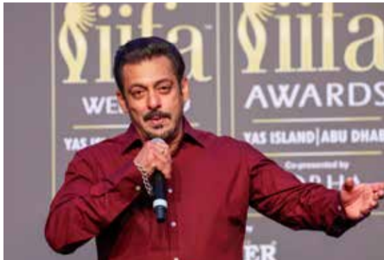
Bollywood actor Salman Khan speaks during a press conference.

Indian cinema also received a boost in March when viral dance hit "Naatu Naatu" won an Oscar