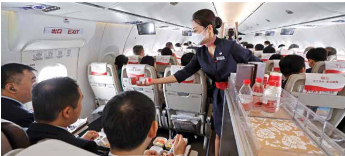
SHANGHAI: A flight attendant distributes bottles of water to passengers during the first commercial flight of China's first domestically produced passenger jet C919 from Shanghai to Beijing on May 28, 2023. — AFP photos

wouldn't miss loan repayments until mid-June but in the meantime it would likely have to halt $25 billion in social security checks and federal salaries. The battle has been monitored closely by the major ratings agencies, with Morningstar and Fitch both warning that they could opt for a downgrade, even if the crisis is averted. When Barack Obama's administration narrowly averted a default 12 years ago, a ratings downgrade cost taxpayers more than $1 billion in higher interest costs. — AFP