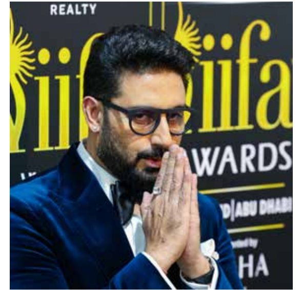
Bollywood actor Abhishek Bachchan.