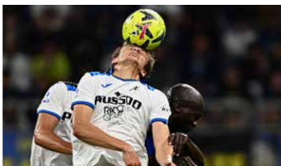
MILAN: Atalanta's Italian defender Giorgio Scalvini (center) and Inter Milan's Belgian forward Romelu Lukaku go for a header during the Italian Serie A football match between Inter and Atalanta on May 27, 2023.

Lukaku's slide-rule pass for Marcelo Brozovic allowed the Croatia midfielder to roll across an unmissable chance to World Cup winner Martinez. Luis Muriel's beautiful stoppage-time strike was only a consolation for the away team. Atalanta are a point ahead of Roma, whose chances of getting into the top four ended with a 2-1 loss at Fiorentina in a battle of teams in European