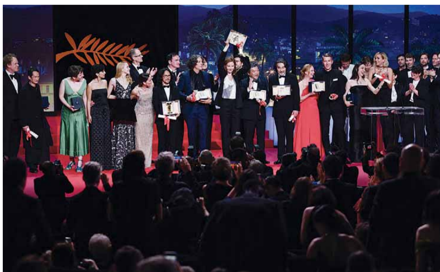
French director Justine Triet (center) celebrates on stage with fellow laureates after she won the Palme d'Or for the film "Anatomie d'une Chute" (Anatomy of a Fall) during the closing ceremony of the 76th edition of the Cannes Film Festival in Cannes, southern France.

Harrison Ford, 80, got weepy when he received an honorary Palme d'Or ahead of the premiere of "Indiana Jones and the Dial of Destiny". Scorsese, also 80, said he was happy to stay out of the competition with his Native American epic "Killers of the Flower Moon", joking to AFP: "It's time for others. I got to go. There are kids around." European auteurs Ken Loach, 86, Marco Bellocchio, 83, and Victor Erice, 82, all brought new films to the festival.