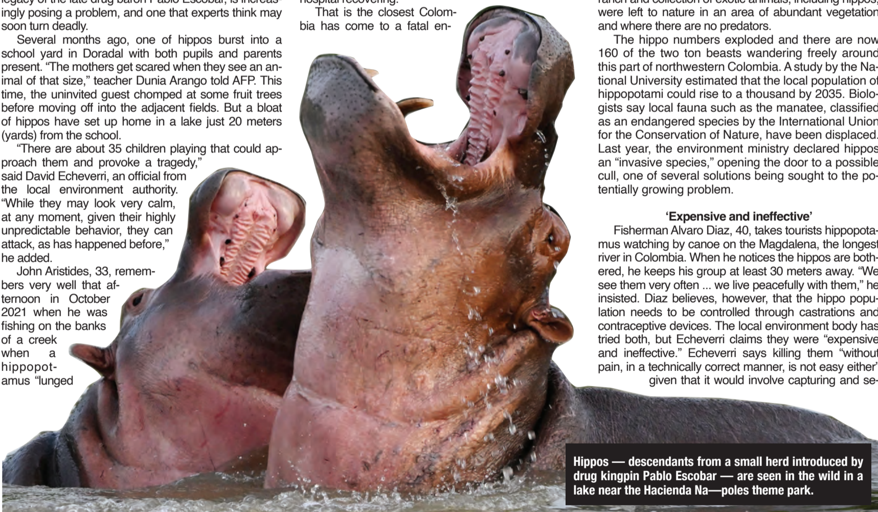
Hippos — descendants from a small herd introduced by drug kingpin Pablo Escobar — are seen in the wild in a lake near the Hacienda Napoles theme park.