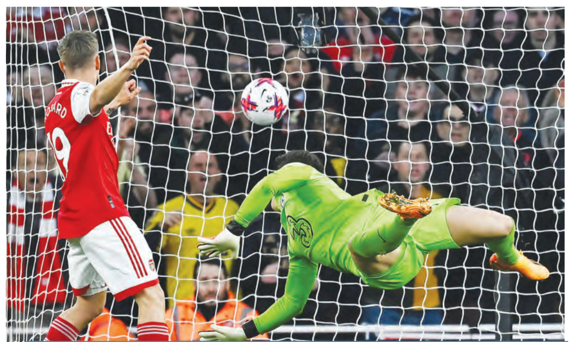
LONDON: Chelsea's Spanish goalkeeper Kepa Arrizabalaga concedes the first goal during the English Premier League football match between Arsenal and Chelsea on May 2, 2023.

That near-miss was a false dawn for abysmal Chelsea as the Gunners turned the screw with a second goal in the 31st minute. Once again, Chelsea allowed Xhaka time to cross into the area and