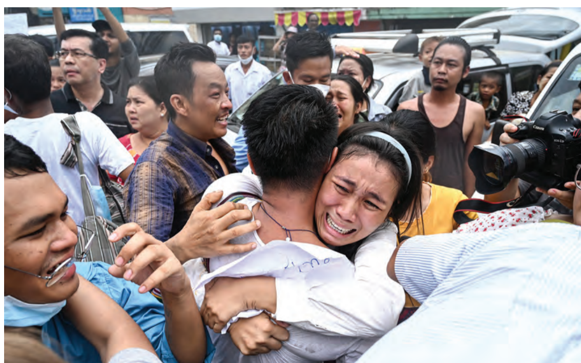
YANGON: A man celebrates with a relative after being released from Insein Prison in Yangon on May 3, 2023. Myanmar's junta announced it had pardoned 2,153 prisoners jailed under a law that criminalises encouraging dissent against the military.

In December, the junta wrapped up a series of