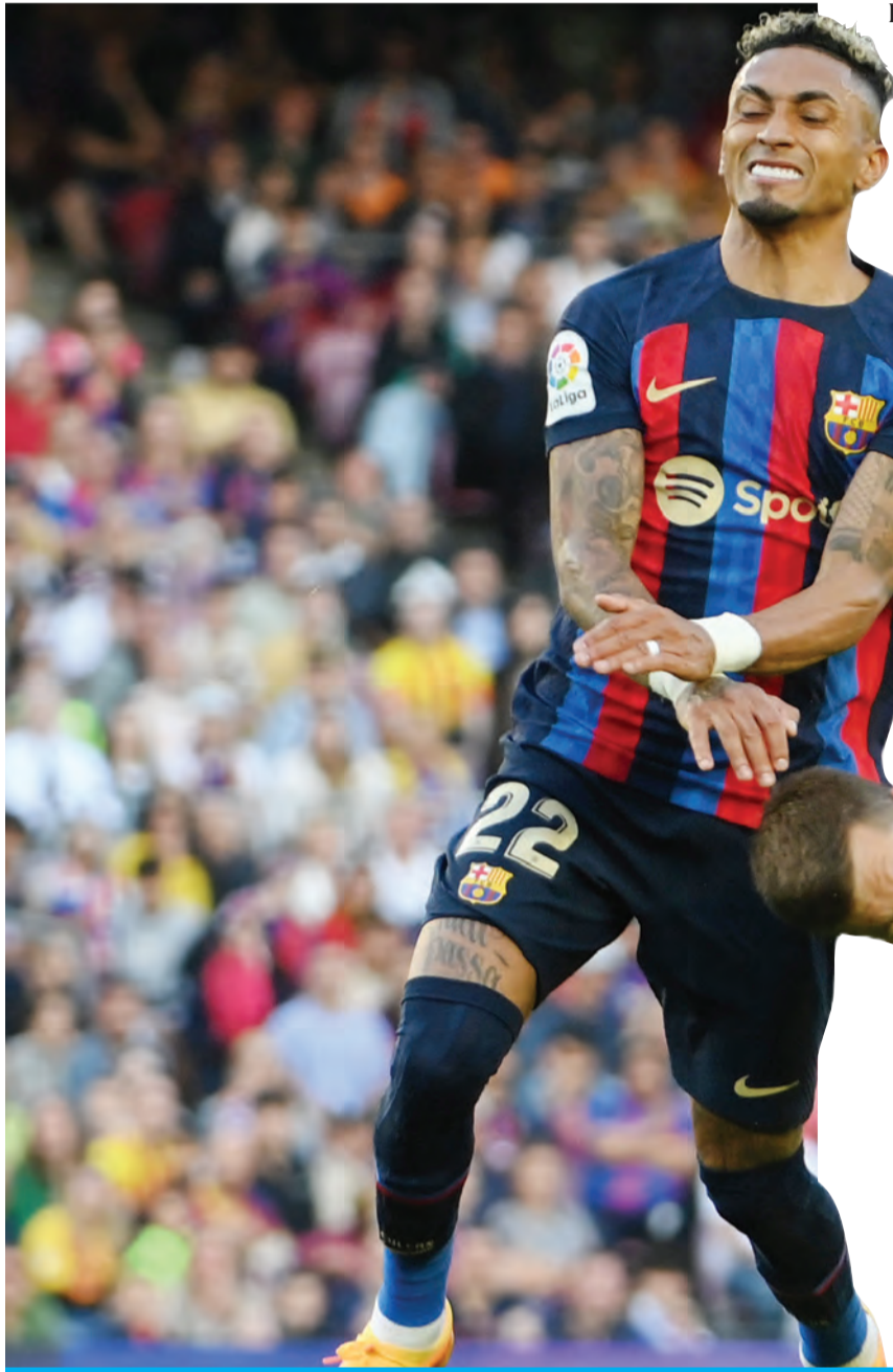
BARCELONA: Barcelona's Brazilian forward Raphinha (left) collides with Osasuna's Spanish goalkeeper Aitor Fernandez during the Spanish league football match between FC Barcelona and CA Osasuna at the Camp Nou stadium on May 2, 2023.

Elche relegated from La Liga; Madrid slip up