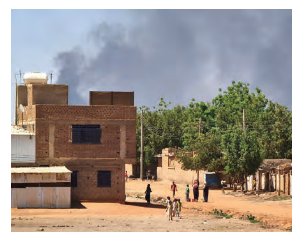
KHARTOUM: People walk as smoke billows in the Sudanese capital Khartoum, on May 3, 2023.

forward to welcoming Kuwait as a Dialogue Partner in Shanghai Cooperation Organization (SCO) soon under its presidency. The FOC is expected to impart the necessary momentum in bilateral relations. It was agreed to hold the next FOC in Kuwait at a mutually convenient time, the release further added.