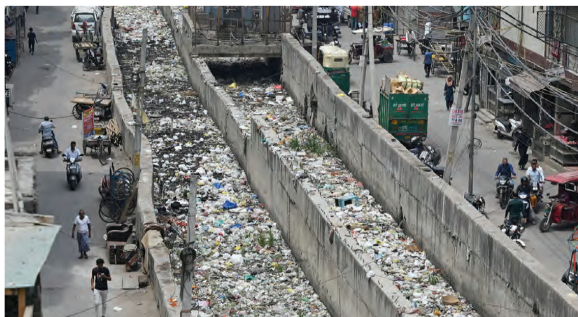
NEW DELHI: In this photograph taken on April 26, 2023, people walk along a street next to a sewage canal filled with garbage at Seelampur neighbourhood in New Delhi.

Although India has made major progress in reducing child mortality, diarrhoea—caused mostly by contaminated water and food—remains a leading killer. More than 55,000 children under five died of diarrhoea across India in 2019, according to a study published last year in the scientific journal BMC Pub-