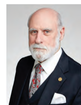
Dr Vinton Cerf

Vinton Cerf, born on June 23 1943, is an American Internet pioneer and is recognized as one of "the fathers of the Internet", sharing this title with co-developer Bob Kahn. He has received honorary degrees and awards that include the National Medal of Technology, the Turing Award, the Presidential Medal of Freedom, the Marconi Prize, and membership in the National Academy of Engi-