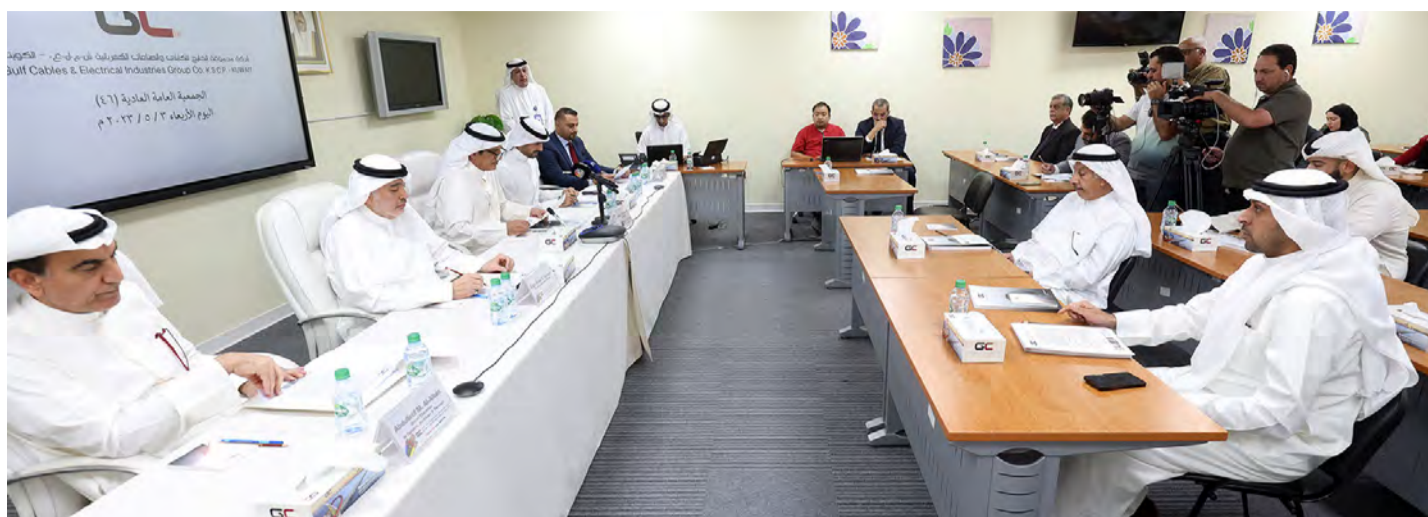
The General Assembly meeting of the Gulf Cables & Electrical Industries Group Co.