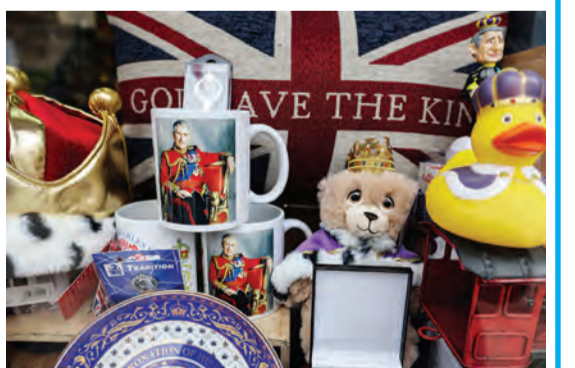
A mug with the portrait of Britain's King Charles III is displayed in the front window of a shop.

ular with royal collectors, has produced a wide variety of tableware for the occasion ranging from £12 to £28 for a mug, tea or coffee cup. All of its pieces are hand-decorated, the manufacturer says, adding that sales have started off on a high note and are expected to be better than for Queen Elizabeth II's Platinum Jubilee last year.