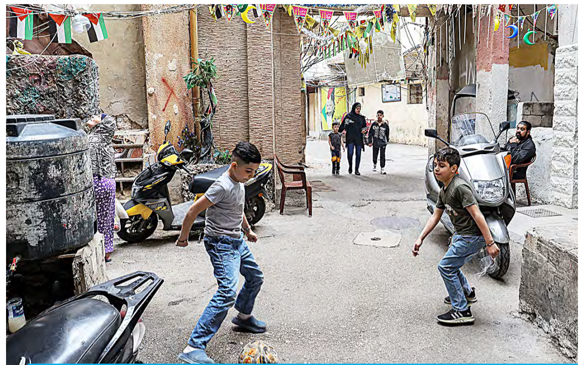
BEIRUT: In this picture taken on April 19, 2023, boys play with a football along an alley at the Shatila camp for Palestinian refugees in the southern suburbs of Beirut.