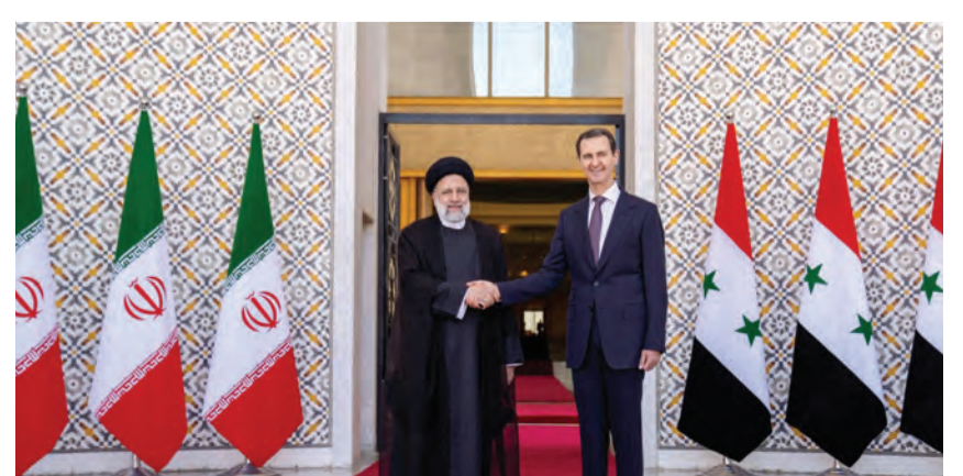
DAMASCUS: Syrian President Bashar Al-Assad receives his Iranian counterpart Ebrahim Raisi at the presidential palace on May 3, 2023.