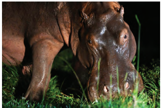
A wild hippo -- descendant from a small herd introduced by drug kingpin Pablo Escobar -- eats grass as it roams near houses in Doradal, Antioquia Department, Colombia.

In their homeland in Africa, they are responsible for more human deaths than almost any other animal, but in Colombia, hippopotami have become loved members of the local community and a tourist attraction. However, in a town close to the city of Medellin, this legacy of the late drug baron Pablo Escobar, is increasingly posing a problem, and one that experts think may soon turn deadly.