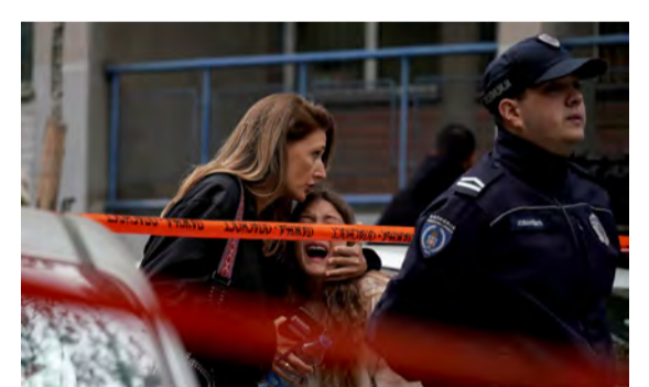
BELGRADE: A parent escorts her child following a shooting at a school in the Serbian capital on May 3, 2023.

“Probably the tragedy would be even bigger if the man did not stand in front of the boy who was shoot-