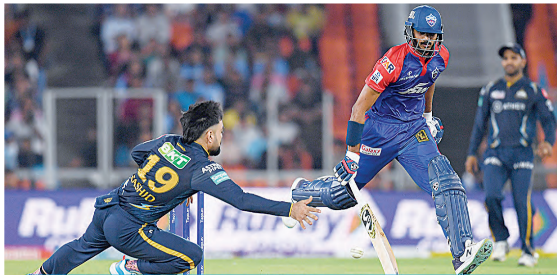
AHMEDABAD: Gujarat Titans' Rashid Khan (left) dives to field the ball as Delhi Capitals' Axar Patel runs to save his wicket during the Indian Premier League (IPL) Twenty20 cricket match between Gujarat Titans and Delhi Capitals on May 2, 2023.

Aman smashed three fours and three sixes in his 44-ball knock before falling to Rashid Khan's leg spin. Shami got Phil Salt for a first ball duck and then Rilee Rossouw, for eight, in his two overs before a double strike in his third. In reply, Khaleel struck in the first over and soon Gujarat were in deep trouble when South African big-hitter David Miller fell for a duck. Pandya attempted to turn it around in a 62-run partnership with Abhinav Manohar, who made 26, but the effort was not enough as Delhi defended their lowest total ever.