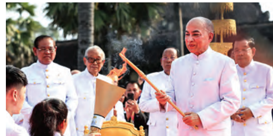
SIEM REAP PROVINCE: Cambodia's King Norodom Sihamoni (2nd right) lights the torch with a candle lit from the sun's rays as Prime Minister Hun Sen (right) looks on during a ceremony prior to the 32nd SEA Games at Angkor Wat temple in Siem Reap province. — AFP

Cambodia and Prime Minister Hun Sen hope the Games will have benefits beyond the two weeks the country plays host. "The Games will not only promote sports but also boost Cambodia's tourism in the post-COVID-pandemic era," said tourism minister Thong Khon, who is also president of the National Olympic Committee. Cambodia has never staged the Games before, in part because of violence and instability that plagued the country throughout the back-end of the 20th century. Hun Sen's government is keen to showcase the country's stability and has gone all-out in whipping up local fervor. A successful event and a creditable medal haul could help boost national sentiment two months ahead of parliamentary elections. — AFP