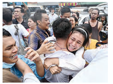
Myanmar junta pardons over 2,000 political prisoners