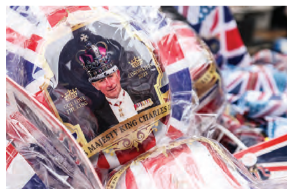
A hat with the portrait of Britain's King Charles III is displayed in the front window of a shop, in Windsor.