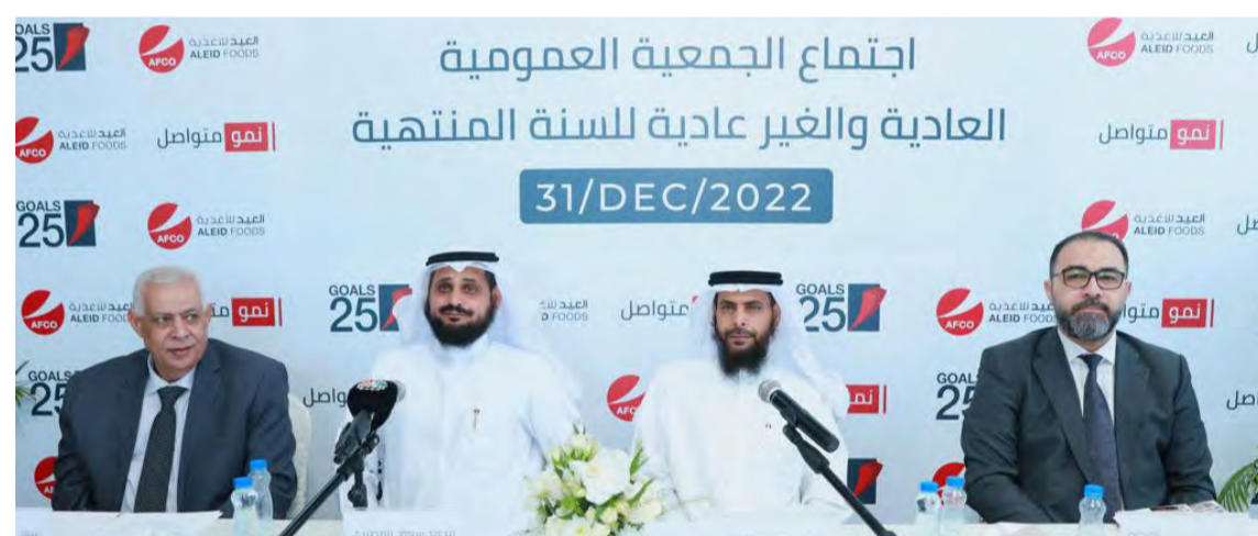
KUWAIT: Aleid Foods Company holds ordinary and extraordinary general assembly on Wednesday.