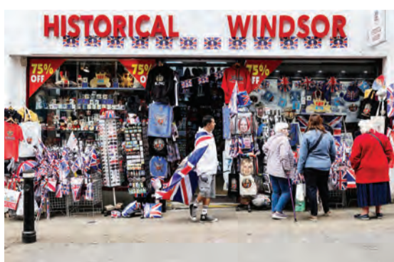
People look at a merchandise shop selling royals souvenirs, in Windsor.

Ceramics company "Emma Bridgewater", pop-