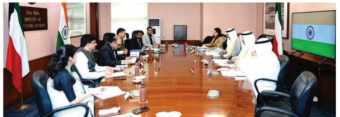
NEW DELHI: Kuwaiti and Indian officials undertook a review of various aspects of bilateral cooperation and exchanged views on regional and international issues of mutual interest.

The Indian side thanked the Kuwaiti side for ensuring the welfare of the large Indian community in Kuwait and looked forward to further facilitation and streamlining of some of the consular issues affecting the community. Both sides agreed on the importance of effective implementation of the bilateral MoU on