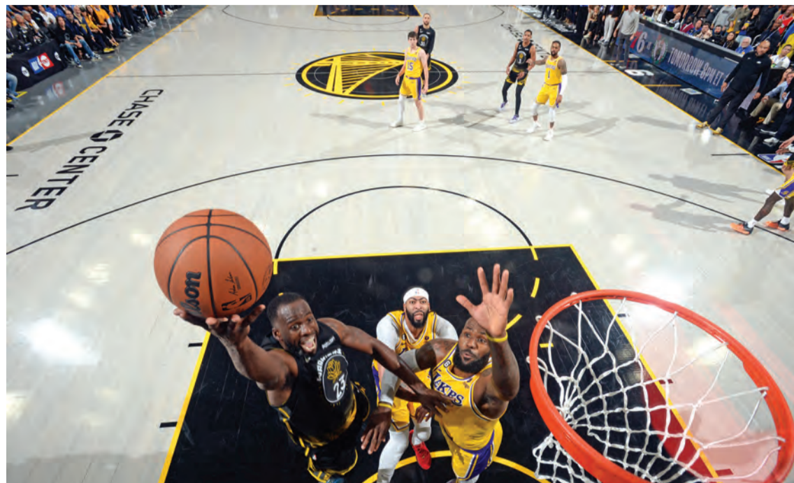
SAN FRANCISCO: Draymond Green #23 of the Golden State Warriors drives to the basket during the game against the Los Angeles Lakers during Game One of the Western Conference Semi-Finals of the 2023 NBA Playoffs on May 2, 2023.

Russell and Schroder added 19 points each while Austin Reaves finished with 10. But it was Davis's all-round performance that stole the show for the Lakers, with the 6ft 10in (2.08m) eight-time All-Star marshalling an immense defensive effort. "He's an elite defender," Lakers coach Darvin Ham said. "He's doing exactly what I anticipated him to do. He's playing like one of the top five NBA players that he is." Ham however was quick to bring his team back to earth after a gripping win. "The biggest thing for us is not to get too happy, to stay humble and respect our opponent, but also know there is a ton of work