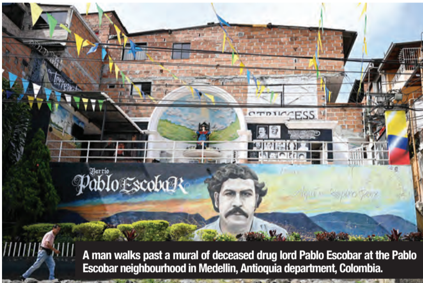
A man walks past a mural of deceased drug lord Pablo Escobar at the Pablo Escobar neighbourhood in Medellin, Antioquia department, Colombia.