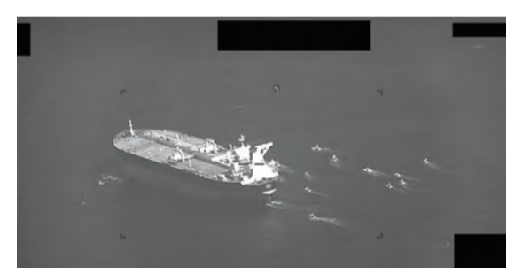
This US Navy handout screenshot of a video shows fast-attack craft from Iran's Islamic Revolutionary Guard Corps navy swarming Panama-flagged oil tanker Niovi as it transits the Strait of Hormuz on May 3, 2023.

The two seizures come after the United States captured a Greek-managed tanker carrying Iranian oil, maritime security firm Ambrey said. The Niovi's capture also followed a warning from Greek authorities of heightened risk after the US seizure, Ambrey added. "Greek authorities had issued a warning that Greek shipping was at an increased risk from Iran after the detention of a Greek-managed Suezmax tanker carrying Iranian oil," it said. Iran has responded with tit-for-tat measures in the past after seizures