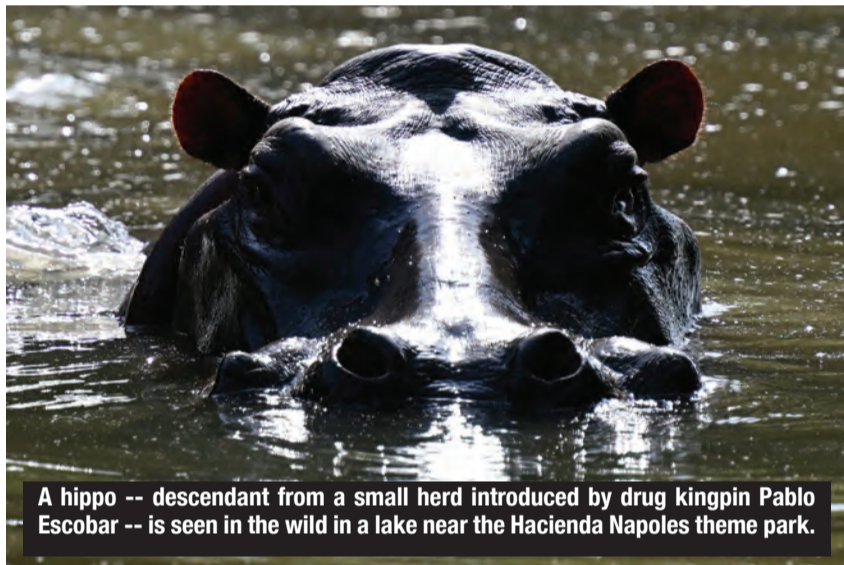
A hippo -- descendant from a small herd introduced by drug kingpin Pablo Escobar -- is seen in the wild in a lake near the Hacienda Napoles theme park.