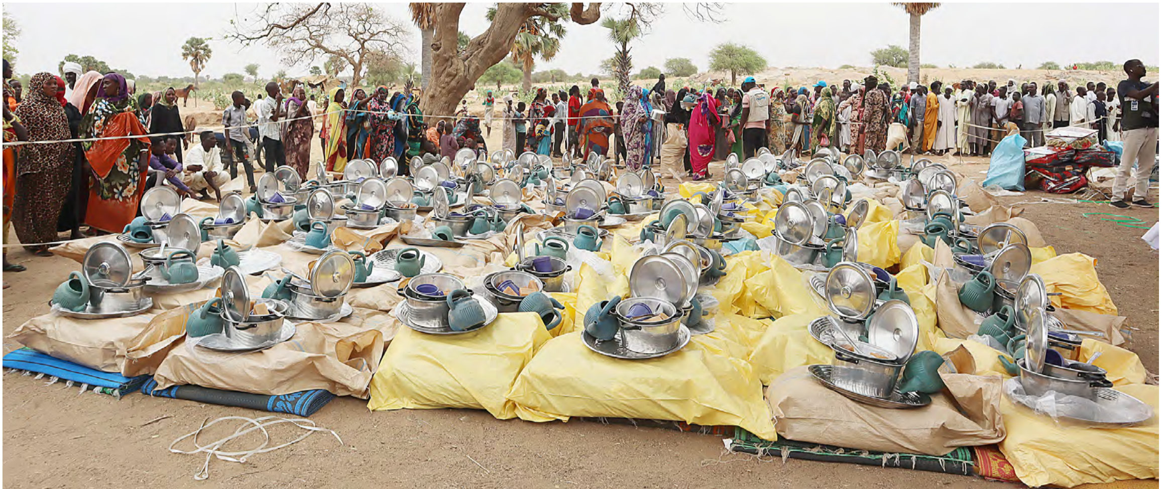
KOUFROUN: Aid kits destined to Sudanese refugees who crossed into Chad are prepared for distribution in Koufroun, near Echbara.