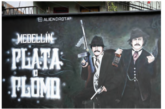
A mural reading "Medellin, money or lead" is seen at the Pablo Escobar neighborhood in Medellin, Antioquia department, Colombia.