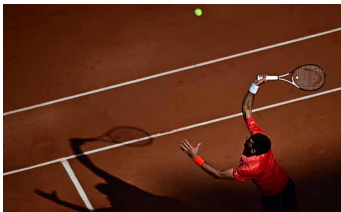
PARIS: Serbia's Novak Djokovic plays a forehand return to Spain's Alejandro Davidovich Fokina during their men's singles match on day six of the Roland-Garros Open tennis tournament at the Court Philippe-Chatrier in Paris on June 2, 2023.

He added: "These are the circumstances that you have to deal with. Sometimes you need help from the physio. Sometimes you need pills. Sometimes you need help from god or angels." In January, Djokovic won a 10th Australian Open title despite playing with a three-centimeter tear in his hamstring. His build-up to the French Open was then hampered by the return