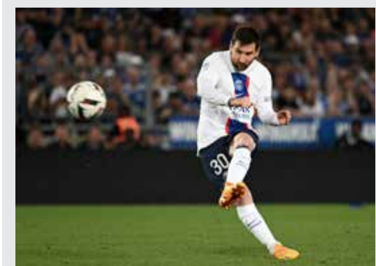
Paris Saint-Germain's Argentine forward Lionel Messi