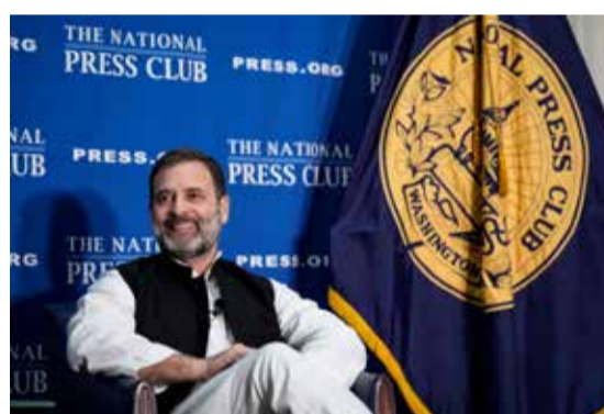
WASHINGTON: Indian opposition leader Rahul Gandhi speaks at the National Press Club on June 1, 2023.

Kim last year declared his country an "irreversible" nuclear power and called for an "exponential" increase in weapons production, including tactical nuclear weapons. The North's weapons of mass destruction and ballistic missile programs "pose a grave threat to international peace and stability", the United States, Japan and South Korea said in their statement.