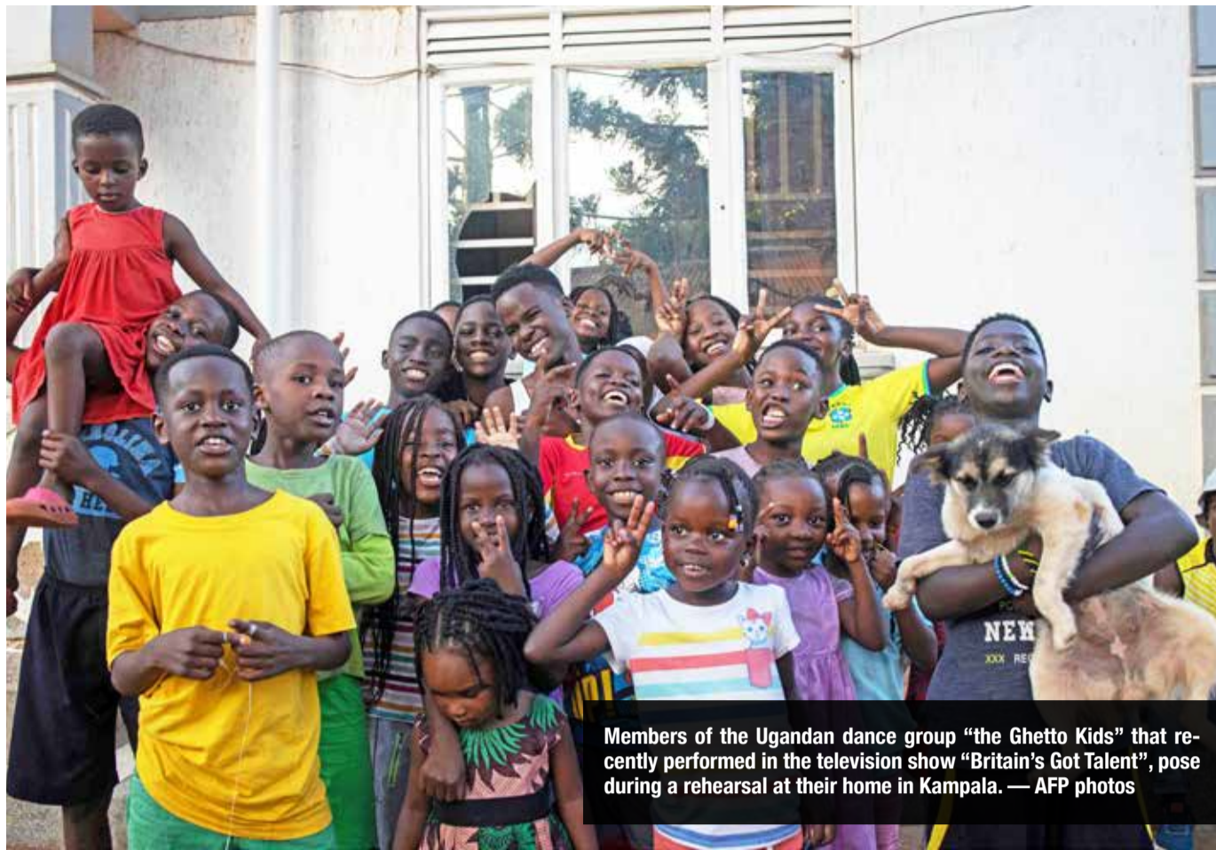
Members of the Ugandan dance group "the Ghetto Kids" that recently performed in the television show "Britain's Got Talent", pose during a rehearsal at their home in Kampala.