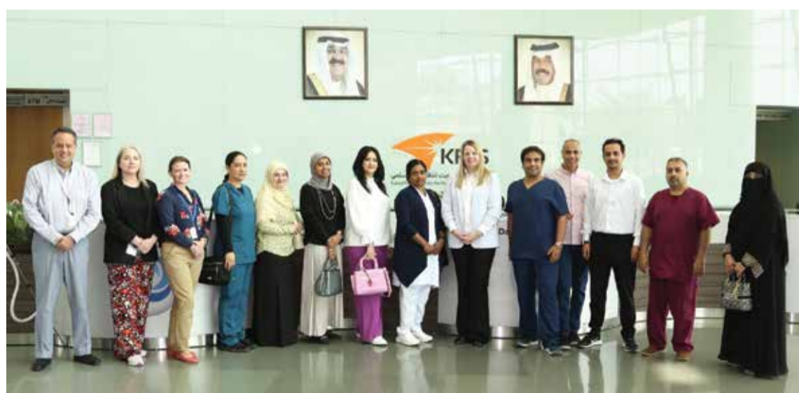
KUWAIT: Healthcare professionals participated in a course held by Dasman Diabetes Institute (DDI) on the prevention and management of diabetic foot complications.

Sources expected this decision, if issued, will cause an increase in the number of people violating residency laws in Kuwait. They said, however, that it's not necessarily a negative consequence as those in violation will be arrested and deported, thereby contributing to remedying the demographic imbalance.