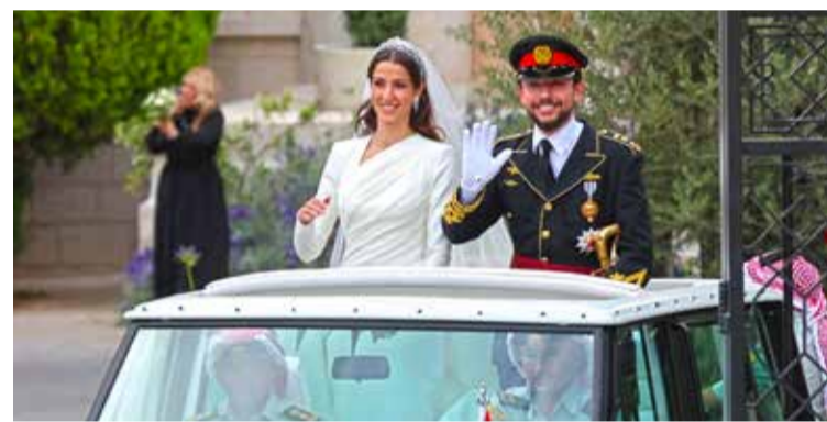
Jordan's Crown Prince Hussein (right) and his wife Rajwa Al-Seif wave as they leave the Zahran Palace in Amman.

to Crown Prince Hussein of Jordan. Rajwa changed from her white long-sleeve gown by Elie Saab into a white cap-sleeve ballgown with a sweetheart neckline and swirling embellishments. While Princess Rajwa kept on her delicate diamond tiara and matching earrings from earlier in the day, she swept her hair into a chignon and added dramatic white opera gloves for the second look.