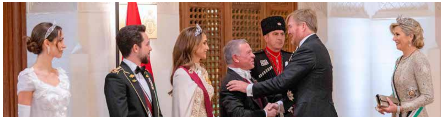
A handout picture from the Jordanian Royal Palace shows, Crown Prince Hussein (second left), his wife Rajwa Al-Seif (left), King Abdullah II (fourth left) and Queen Rania (third left) greeting Dutch King Willem-Alexander and Queen Maxima during a royal ceremony at the Zahran Palace in Amman.