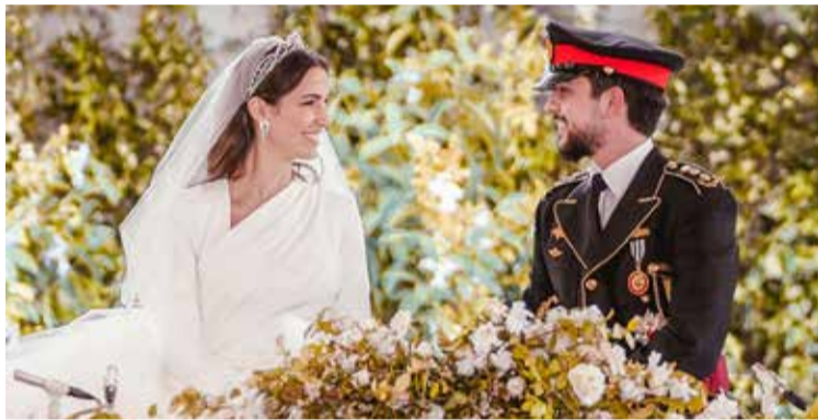
A handout picture from the Jordanian Royal Palace shows Crown Prince Hussein (right) and his wife Rajwa Al-Seif sitting during their wedding ceremony at the Zahran Palace.

On her feet, Princess Rajwa went for something sensible — flats! The white shoes with pointed toe were ideal for the march to meet her groom