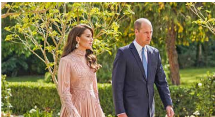
A handout picture from the Jordanian Royal Palace shows Britain's Prince William (right) and Princess Catherine arriving at the Zahran Palace in Amman.

Hussein followed in his father's footsteps by attending Britain's Royal Military Academy Sandhurst and then studied history at Washington's Georgetown University. His bride was born and raised in conservative Saudi Arabia but is also Western-educated, having studied architecture at Syracuse University in New York. — Agencies