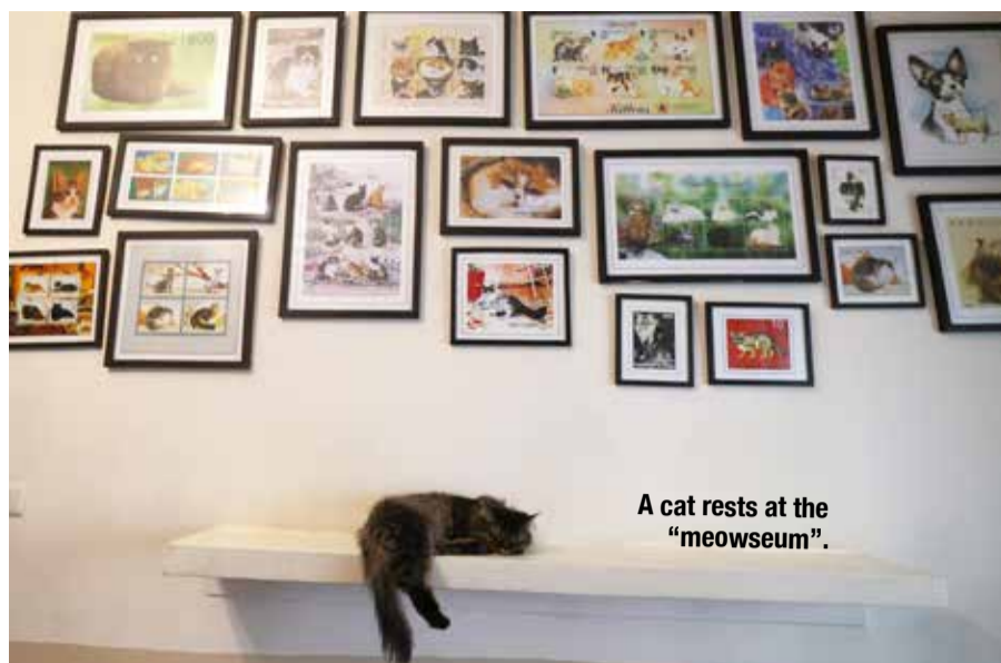
A cat rests at the "meowseum".