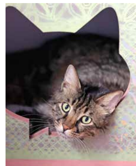
A cat rests at the "meowseum".