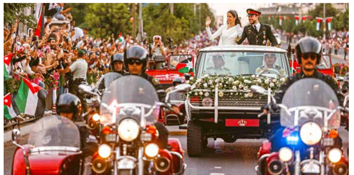
A handout picture from the Jordanian Royal Palace shows Jordan's Crown Prince Hussein and his wife Rajwa Al-Seif traversing the streets of Amman in a royal red motorcade following their wedding ceremony.