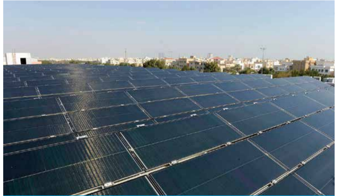
KUWAIT: The electricity ministry is studying a proposal to install solar energy systems in Failaka and Boubyan islands. Photo used for illustrative purposes only.