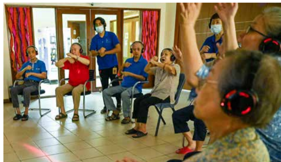
Residents with dementia participating in a silent disco at Apex Harmony Lodge in Singapore.