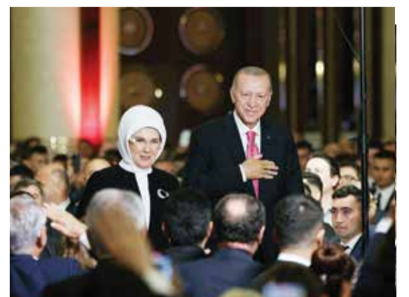
ANKARA: Turkish President Tayyip Erdogan and his wife Emine greet guests during his oath-taking ceremony at the Presidential Complex on June 3, 2023.