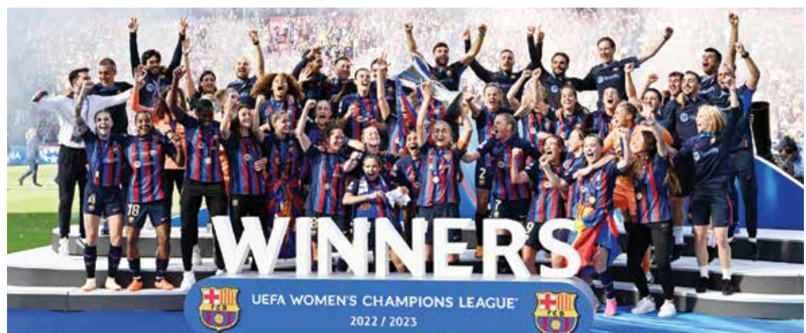
EINDHOVEN: Barcelona's players celebrate with the trophy after winning the UEFA Women's Champions League final football match between FC Barcelona and Wolfsburg on June 3, 2023.