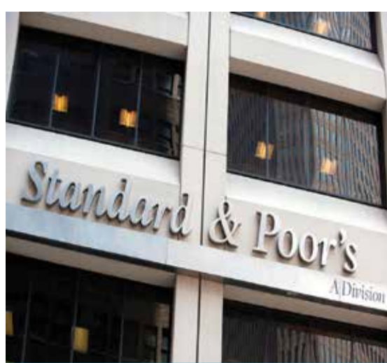
PARIS: Photo shows the front of the New York offices of Standard & Poor's August in New York.

"In fact, there has been a steady deterioration in governance over the last 15 years, with increased political polarization and partisanship,"