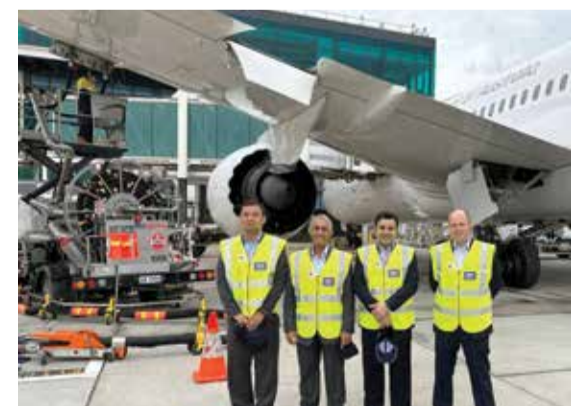
KUWAIT: Q8Aviation's general manager and executive vice president for planning and finance are seen at Melbourne Airport.