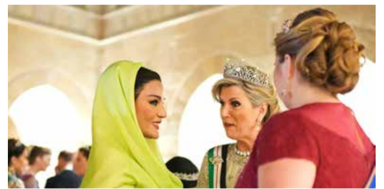
shows Sheikha Moza bint Nasser (left) attending a royal ceremony at the Husseinia Palace in Amman.