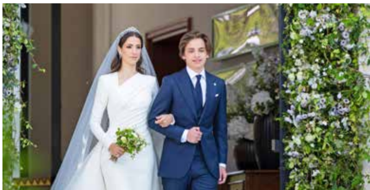
A handout picture from the Jordanian Royal Palace shows Jordan's Prince Hashem bin Abdullah walking with Rajwa Al-Seif at the Zahran Palace in Amman.