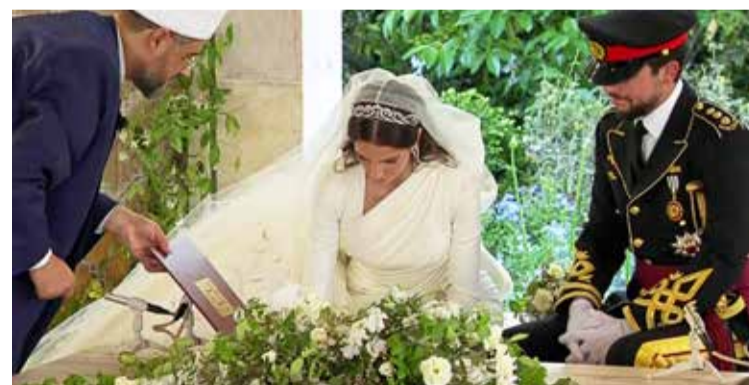
This screen grab taken from a footage released by the Jordanian Royal Palace shows Crown Prince Hussein (right) and his wife Rajwa Al-Seif signing documents during their wedding ceremony at the Zahran Palace in Amman.