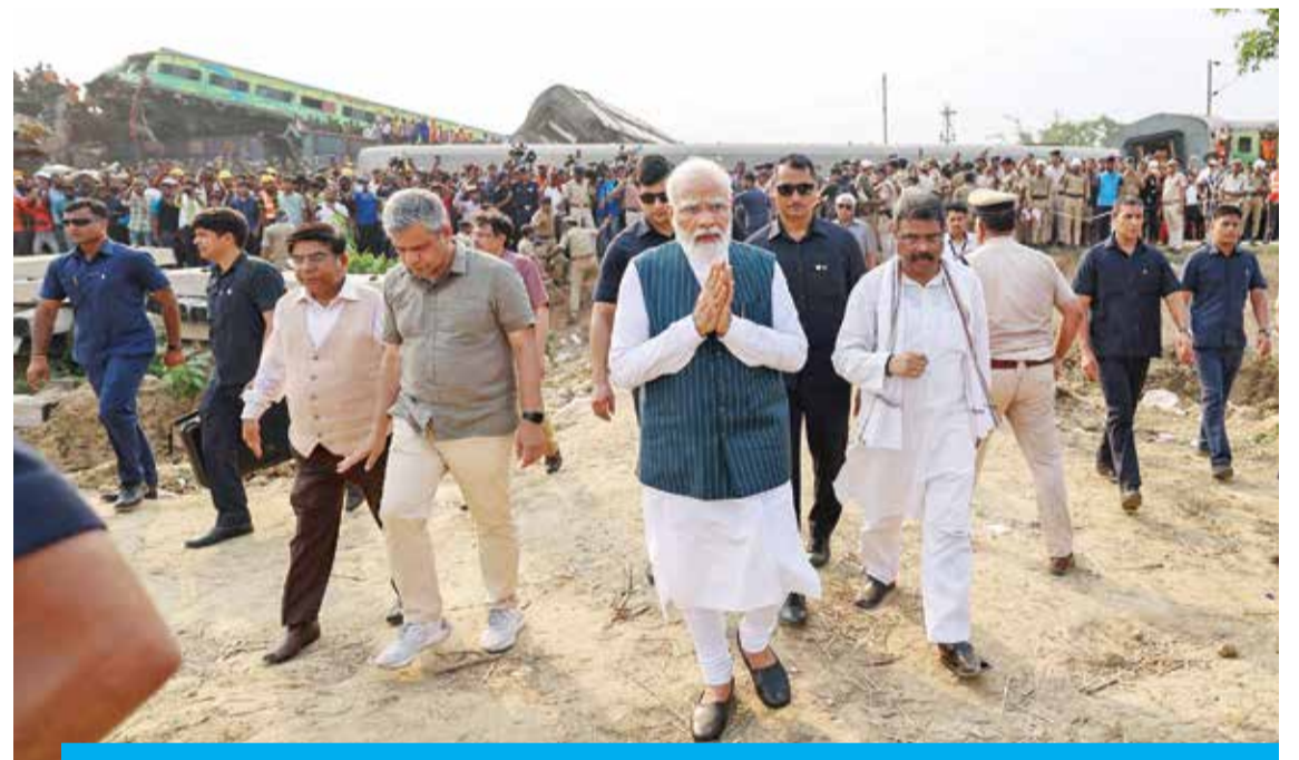
BALASORE, India: This handout photograph taken on June 3, 2023 shows India's Prime Minister Narendra Modi visiting the site of a three-train collision in India's eastern state of Odisha.