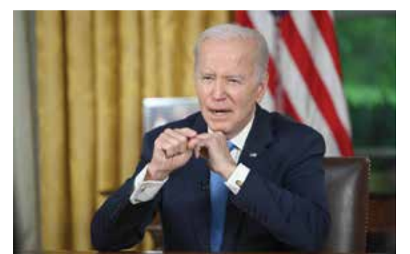
WASHINGTON: US President Joe Biden addresses the nation on averting default and the Bipartisan Budget Agreement, in the Oval Office of the White House.

Kevin McCarthy, the speaker of the Republican-led House, had touted the compromise bill as a big victory for conservatives, although he faced a backlash from hardliners on the right who said he made too many concessions. But Biden, who is campaigning for re-election in 2024, sees the dramatic resolution to the crisis as a win, showcasing his negotiating powers and his pitch to be the moderate voice in an increasingly extreme political landscape.