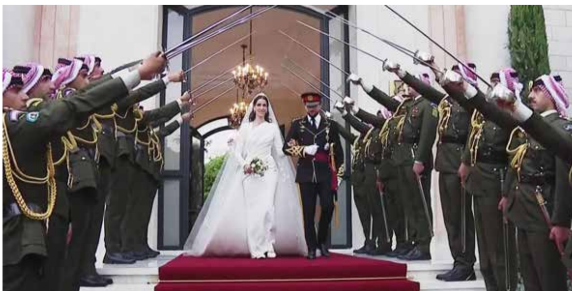
This screen grab taken from a footage released by the Jordanian Royal Palace shows Crown Prince Hussein and his wife Rajwa Al-Seif leaving the Zahran Palace in Amman.