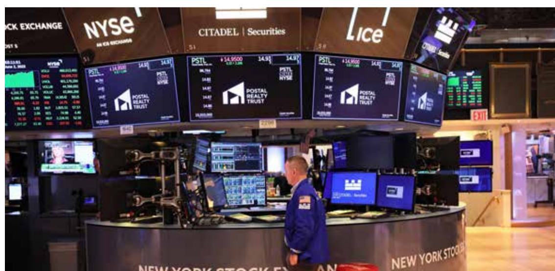
NEW YORK: Traders work on the floor of the New York Stock Exchange during afternoon trading in New York City.