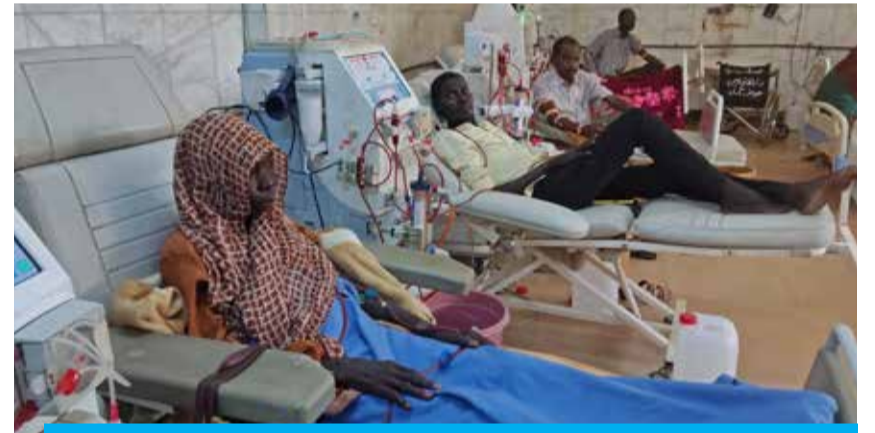
KHARTOUM: Sudanese patients suffering from kidney failure undergo dialysis treatment at the Soba Hospital on June 3, 2023.

Washington announced on Friday that Secretary of State Antony Blinken will next week travel to Saudi Arabia where he will discuss "strategic cooperation on regional and global issues". His trip follows efforts by both countries to broker a durable ceasefire in Sudan.