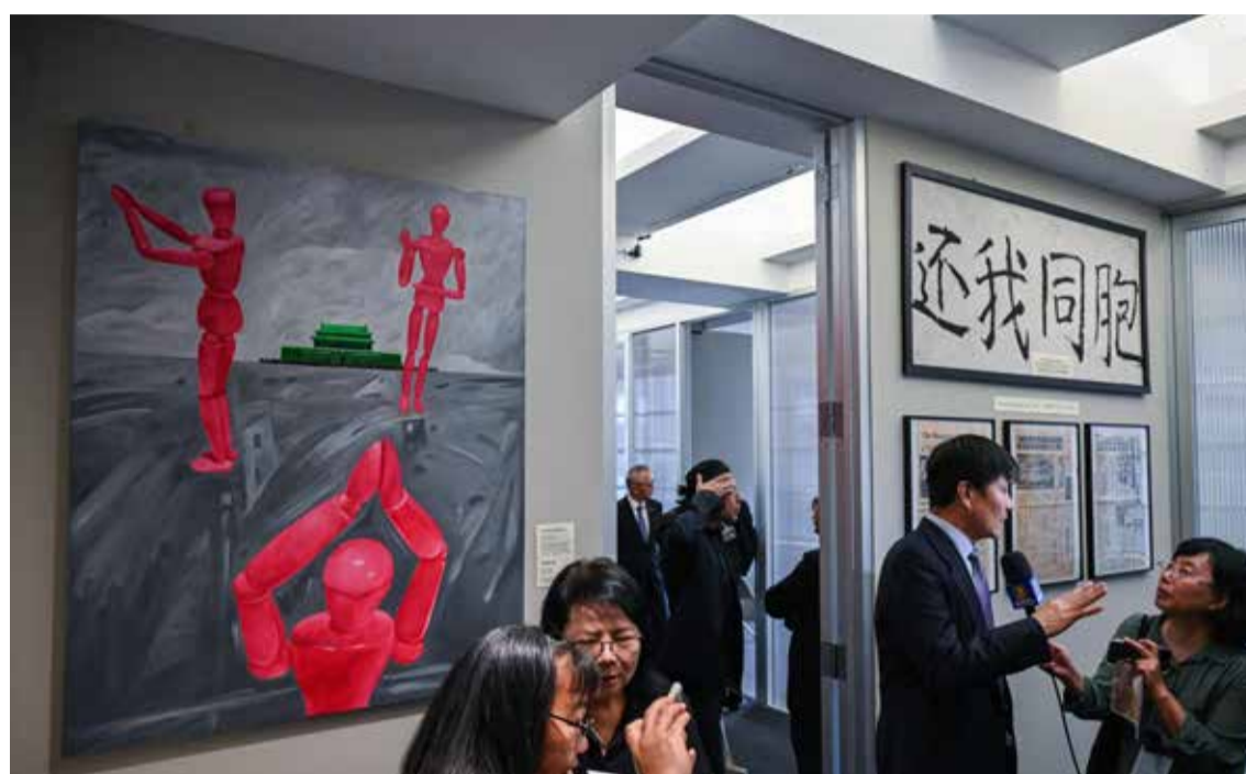
NEW YORK: Visitors arrive for the opening of a Hong Kong Protest Pavilion and the new June 4th Tiananmen Memorial Museum on June 2, 2023, ahead of the 34th anniversary of the 1989 crackdown on pro-democracy demonstrations around Tiananmen Square in Beijing.

YouTube insisted that its other existing rules against election misinformation remain unchanged, including its prohibition of content that deceives voters or