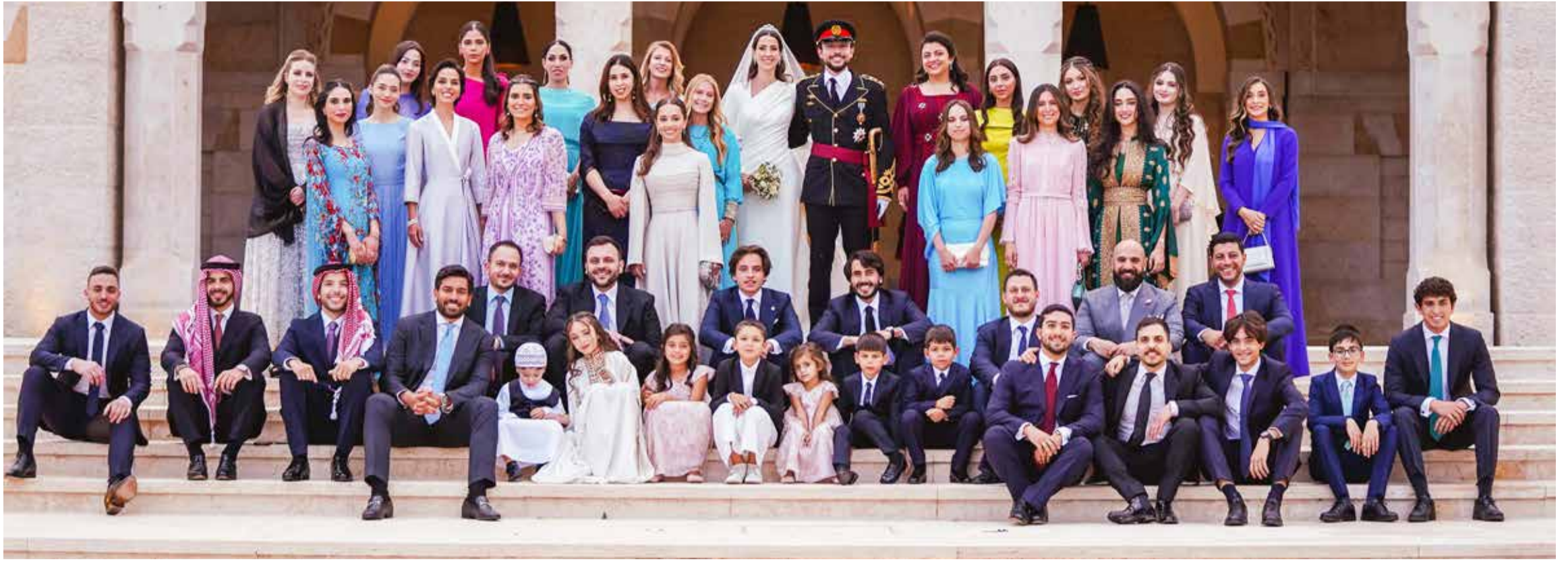
A handout picture from the Jordanian Royal Palace shows Jordan's Crown Prince Hussein (center right) and wife Saudi architect Rajwa Al-Seif (center left) posing for a picture with guests during their royal wedding ceremony in Amman.