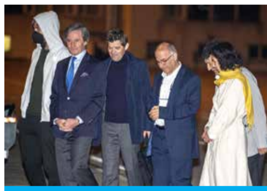
MELSBRÖEK, Belgium: Belgium's Minister of Foreign Affairs Hadja Lahbib welcomes Thomas Kjems, Kamran Ghaderi and Massud Mossaheb upon arrival at Melsbroek military airport on June 3, 2023, after being released from detention by Iran.

The exact number of foreign passport holders still be-