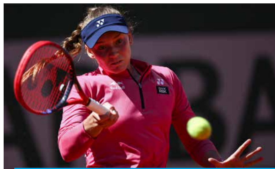
PARIS: Kazakhstan's Elena Rybakina plays a forehand return to Czech Republic's Linda Noskova during their women's singles match on day five of the Roland-Garros Open tennis tournament at the Court Suzanne-Lenglen in Paris.

Italian Lorenzo Sonogo battled back from two sets down to knock out Rublev and reach the last 16 for the second time. The world number 48 was two points from defeat during a fourth-set tie-break but prevailed 5-7, 0-6, 6-3, 7-6 (7/5), 6-3 after three hours and 42 minutes. Sonogo will face Russian 11th seed Karen Khachanov