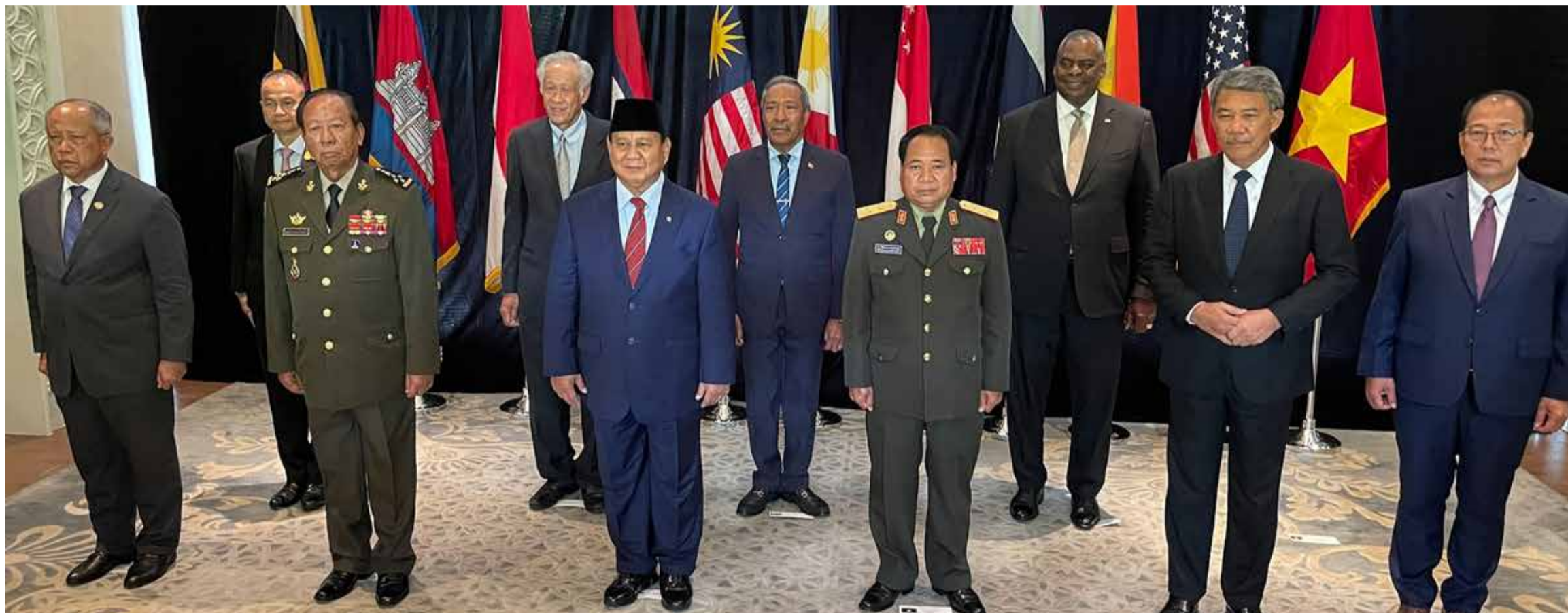
SINGAPORE: This handout photo shows US and Southeast Asian defense ministers posing for a photo at the 20th Shangri-La Dialogue summit on June 3, 2023.

SINGAPORE: US Secretary of Defense Lloyd Austin said Saturday it was "essential" to renew dialogue with China to avoid "misunderstandings" that could lead to a conflict between the two superpowers. The United States had invited Austin's Chinese counterpart Li Shangfu to meet on the sidelines of a defence summit in Singapore, but the Pentagon said Beijing declined. A member of China's delegation told AFP that the removal of US sanctions on its minister is a pre-condition for talks.