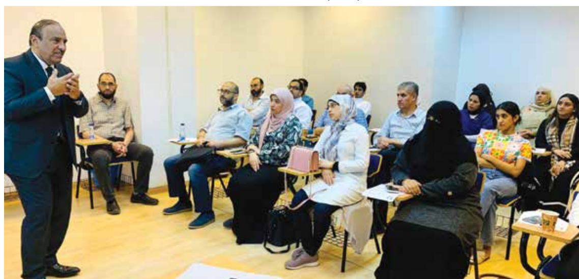
KUWAIT: Nurses listen to a lecture on communicating with cancer patients as part of the CAN training program.

He said CAN trains nurses on the communication skills with patients and their families, especially cancer patients. He said an integrated program presented by oncologists to the trainees and it includes description of cancer disease, its stages, the rate of