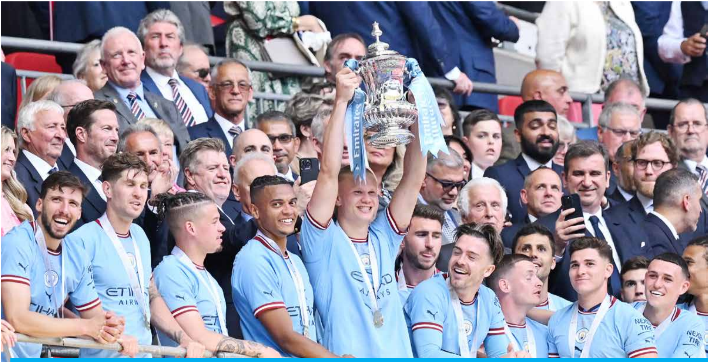
LONDON: Manchester City's Norwegian striker Erling Haaland (center) lifts the trophy after the English FA Cup final football match between Manchester City and Manchester United at Wembley stadium on June 3, 2023.

LONDON: Manchester City are one game away from a historic treble after Ilkay Gundogan scored twice to beat Manchester United 2-1 in the FA Cup final on Saturday. Pep Guardiola's men completed a domestic double at Wembley and can become just the second side, after United in 1998/99, to win the Premier League, FA Cup and Champions League in the same season should they beat Inter Milan to become European champions for the first time on June 10. Gundogan scored the fastest goal in FA Cup final history after just 12 seconds. United leveled on 33 minutes through Bruno Fernandes' penalty after Jack Grealish was harshly penalized for handball. But the City captain, in what could be his final game for the club on English soil, volleyed home the winner six minutes into the second-half. The first ever major final between the Manchester giants had the most explosive of starts.