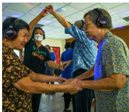
Residents with dementia participating in a silent disco at Apex Harmony Lodge in Singapore.