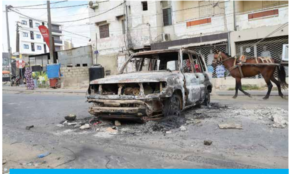
DAKAR: This general view shows the charred remains of a vehicle on a street on June 3, 2023, following deadly violence in the Senegalese capital.