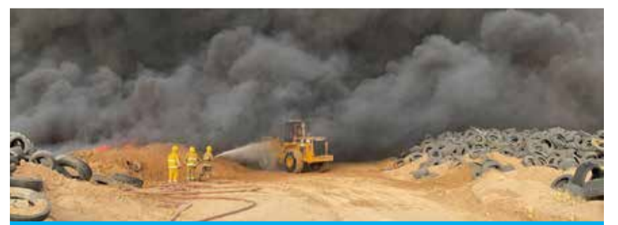
KUWAIT: Firemen battle a blaze at the Salmi tyre dump on June 2, 2023.

Separately, a huge fire broke out at a house in Jleeb Al-Shuyoukh on Thursday, killing three people. A statement from KFF blamed the disaster on poor safety precautions