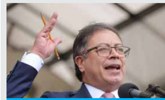
BOGOTA: Colombian President Gustavo Petro delivers a speech during a military ceremony at the Jose Maria Cordova Military School on June 2, 2023.