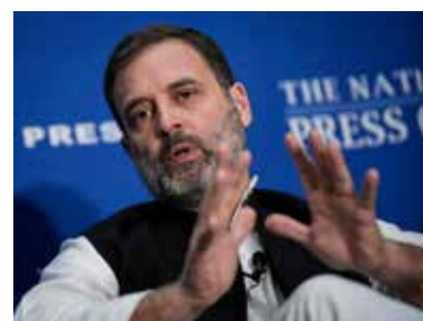
United opposition can beat Modi in 2024: Gandhi