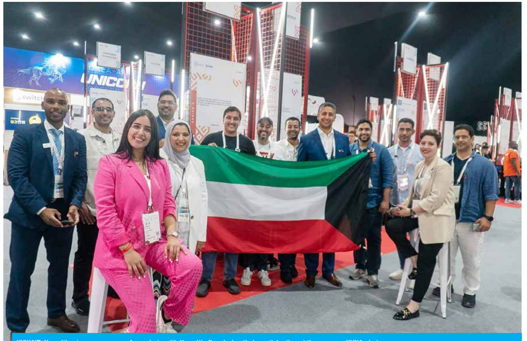
KUWAIT: Kuwaiti entrepreneurs pose for a photo with Kuwait's flag during their participation at the expo.

Exhibition attended by more than 400 decision makers from 95 countries