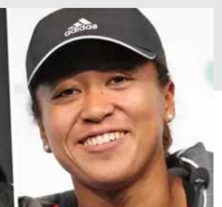
Cordae and Osaka