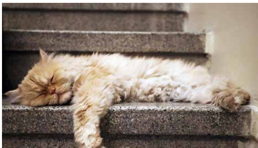
A Persian cat sleeps at the "meowseum", a privately funded cat museum and cafe where some 30 friendly felines roam freely throughout the exhibition space, in Tehran.