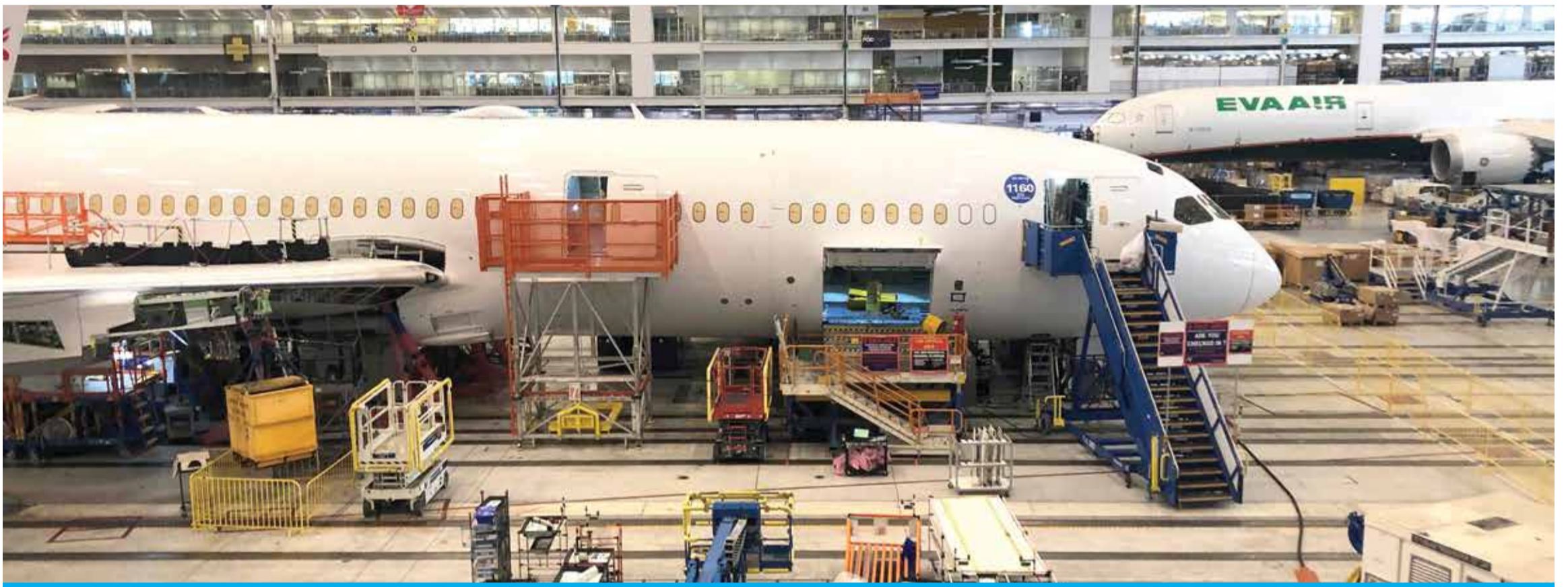
NORTH CHARLESTON: Boeing 787 Dreamliners are built at the aviation company's North Charleston, South Carolina, assembly plant. The plant is located on the grounds of the joint-use Charleston Air Force Base and Charleston International Airport.

Boeing speeds up production of 787 Dreamliners