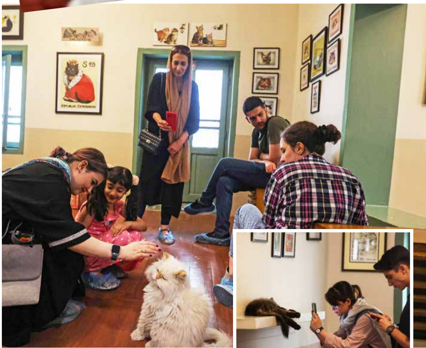
People visit the "meowseum".