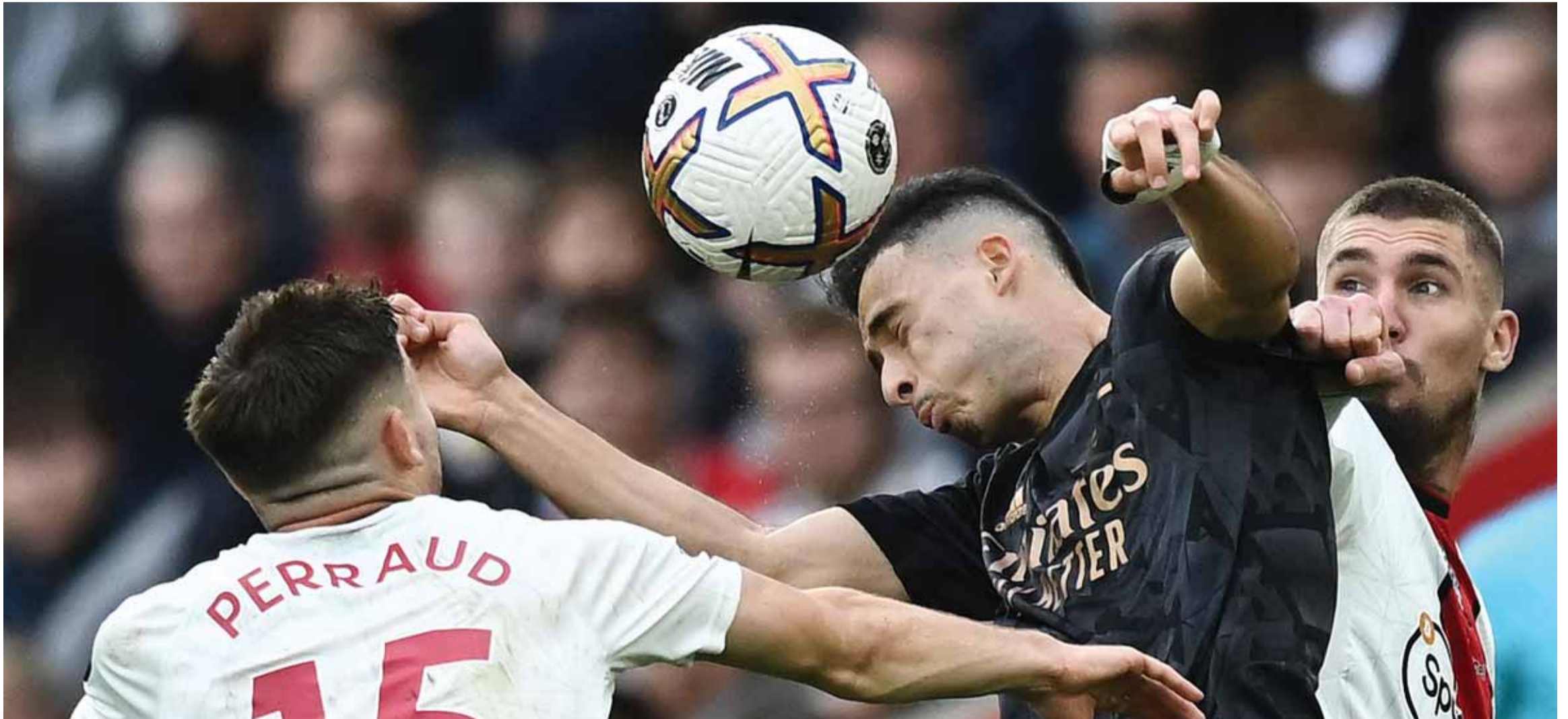
SOUTHAMPTON: Southampton's French defender Romain Perraud (left) vies with Arsenal's Brazilian midfielder Gabriel Martinelli (center) to head the ball during the English Premier League football match on October 23, 2022.