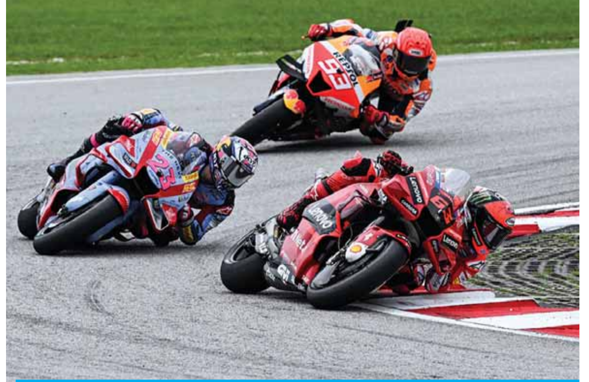
SELANG: Ducati Lenovo's Italian rider Francesco Bagnaia speeds ahead of Ducati Gresini Racing's Italian rider Enea Bastianini and Repsol Honda's Spanish rider Marc Marquez during the MotoGP Malaysian Grand Prix motorcycle race on October 23, 2022.

"I gave my maximum today, couldn't do any better, but I'm proud of myself because I felt this is one of my best rides of the season," added the Frenchman who was riding with a fractured finger, sustained when he fell in FP4 on Saturday. "Riding the bike was not the problem with the medicine and adrenalin I had today," said Quartararo of the injury. "I'm happy at least we're bringing it to Valencia. Even if the chance is super small, we did everything to bring it to Valencia."