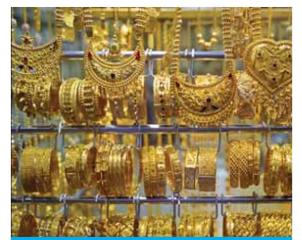
KUWAIT: Gold ornaments are displayed at a jewelry shop in downtown Kuwait.

Gold futures contracts for December delivery