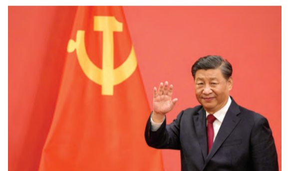
BEIJING: China's President Xi Jinping waves during the introduction of members of the Chinese Communist Party's new Politburo Standing Committee on Oct 23, 2022.