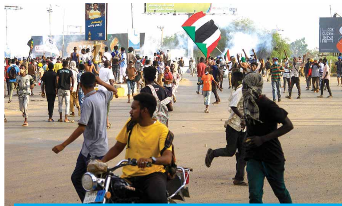
KHARTOUM, Sudan: Sudanese protesters run for cover from teargas fired by security forces during a demonstration in Omdourman the capital Khartoum twin city.

"Please accept my warmest congratulations to you upon the glad news that... you were elected again as the general secretary of the Party Central Committee," read Kim's message carried by KCNA. "I, together with