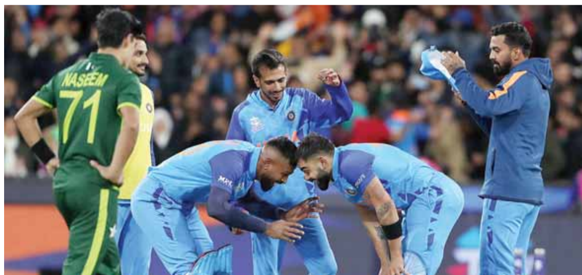
MELBOURNE: India's Virat Kohli (right) and India's Hardik Pandya celebrate their win during the ICC men's Twenty20 World Cup 2022 cricket match between India and Pakistan on October 23, 2022.

"Those two guys are experienced. Staying calm and taking the game deep was very critical. Good for our confidence," he said. A deflated Pakistan captain Babar Azam paid tribute to Kohli. "Our bowlers bowled really well. We had a chance, we tried to stick to our plans. But credit to Virat Kohli." Few sporting rivalries match the passion of India-Pakistan and the atmosphere, already electric, hit fever pitch when Pakistan's openers were dismissed cheaply after being sent into bat, with Azam out lbw