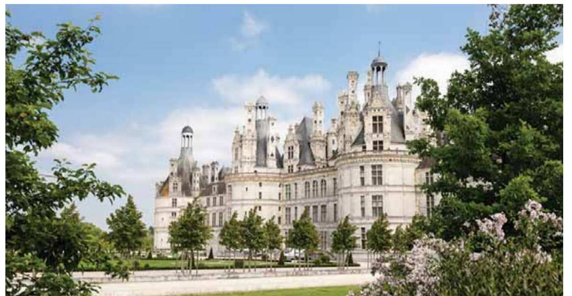
Energy bills in France are expected to soar compared to last year, partly as a result of a hike in gas prices following the Russian invasion of Ukraine.

Of that, the energy bill is now expected to be equivalent to the cost of two temporary exhibitions and a