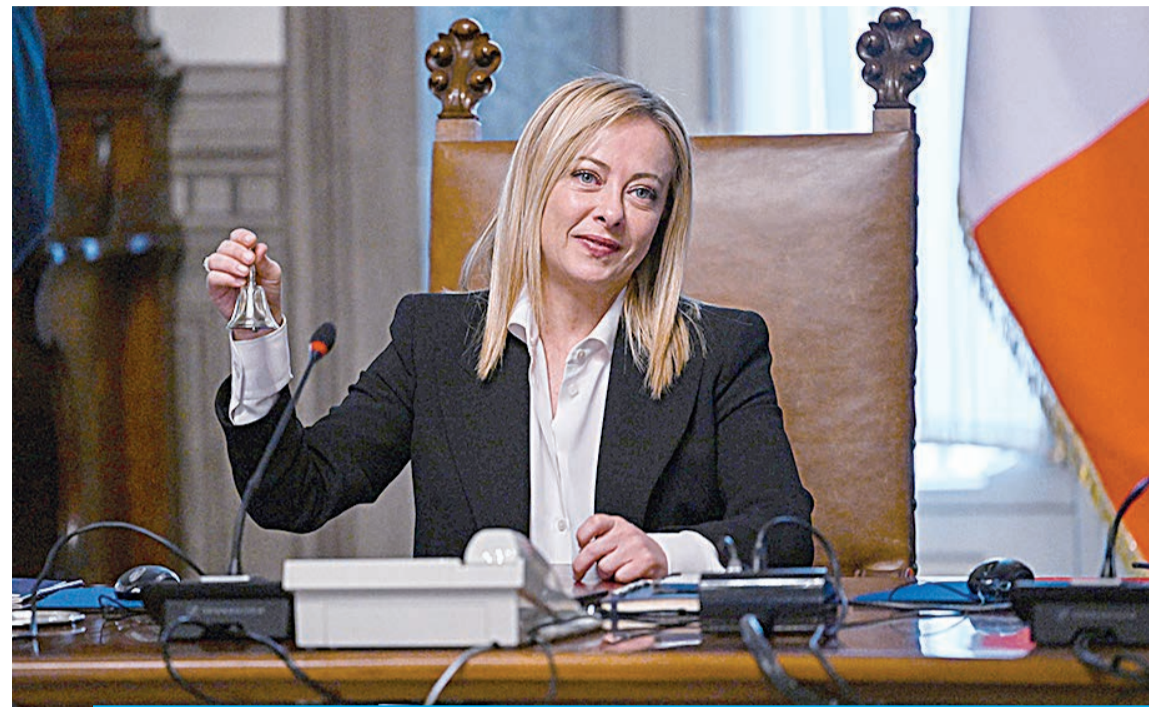
ROME: Italy's new Prime Minister, Giorgia Meloni rings the bell as she presides over her government's first Cabinet meeting on October 23, 2022 at Palazzo Chigi in Rome.

But her ministerial experience is limited to three years as youth minister under Berlusconi's 2008-