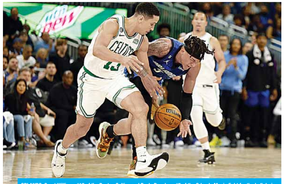
ORLANDO: Grant Williams #12 of the Boston Celtics and Paolo Banchero #5 of the Orlando Magic fight for the ball during the fourth quarter at Amway Center on October 22, 2022.

In Dallas, Luka Doncic scored 21 of his 32 points in the first quarter and the Mavericks steamrolled the Memphis Grizzlies 137-96 in their home opener. Ja Morant, coming off a 49-point display against the