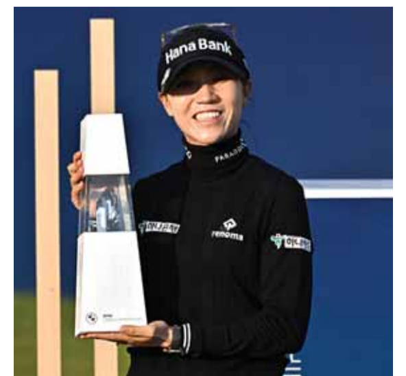
WONJU: Lydia Ko of New Zealand poses with the trophy after her victory in the BMW Ladies Championship golf tournament at Oak Valley Country Club in Wonju on October 23, 2022.

Earlier this month, the 34-year-old announced that the BMW Ladies Championship would be her final LPGA tournament. A tearful Choi made par on the par-five hole to card a four-under 68, her best round of the week, finishing two-under 286 for the tournament. "I was fighting back tears from the beginning of the 18th hole," said Choi. "After I hit the tee shot, Amy Yang said, 'Good job,' and started crying. "And that last putt, I couldn't really see the ball because of my tears."