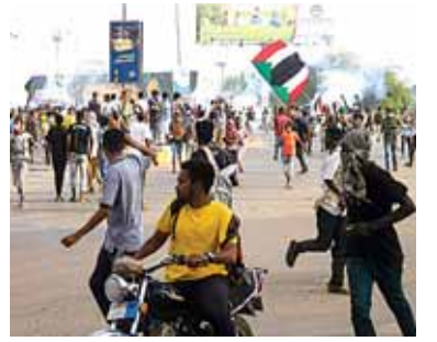
Sudan still mired in crisis a year since latest coup