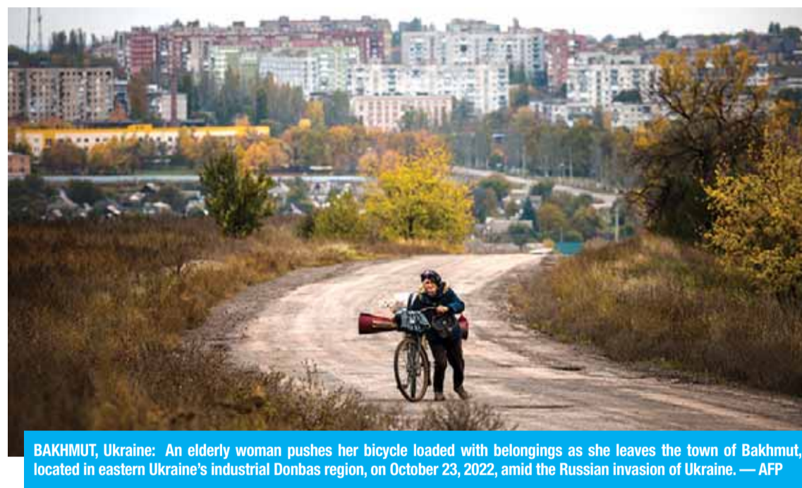
BAKHMUT, Ukraine: An elderly woman pushes her bicycle loaded with belongings as she leaves the town of Bakhmut, located in eastern Ukraine's industrial Donbas region, on October 23, 2022, amid the Russian invasion of Ukraine. — AFP

Energy prices were already rising in 2021 and bills have surged since Russia invaded Ukraine in February. The International Energy Agency (IEA) said in an analysis in October 2021 that the factors behind the surge in gas, coal, electricity and gasoline prices included the sudden post-pandemic rebound. —AFP