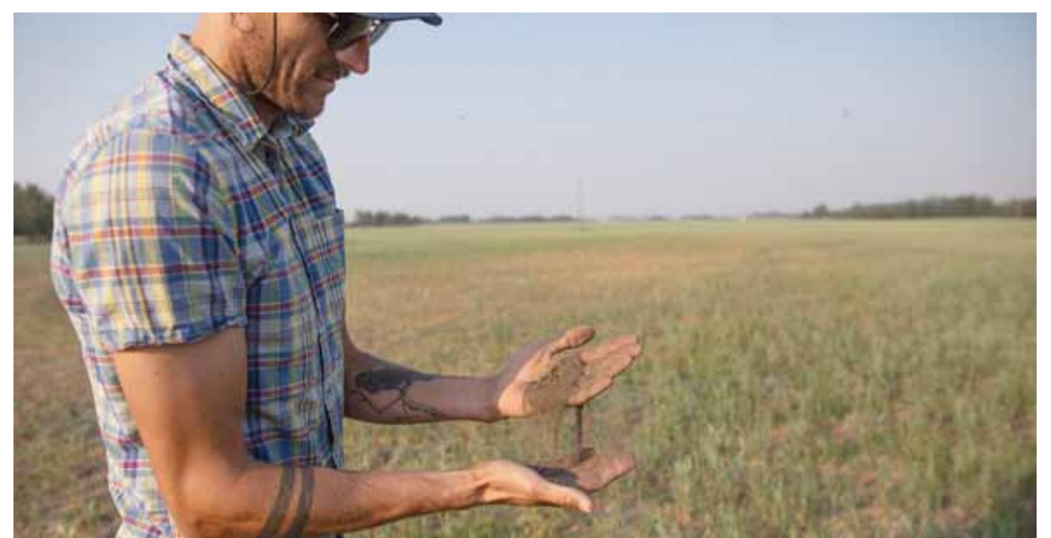
Drought has hit the three major US crops: wheat, corn and soybeans, and the US Department of Agriculture recently had to lower its nationwide yield predictions.

BRUSSELS: The European Commission warned Germany months ago against Chinese investment in Hamburg's port, a source close to the matter told AFP on Saturday, as Chancellor Olaf Scholz faced criticism for reportedly backing the transaction. The source confirmed information in a report