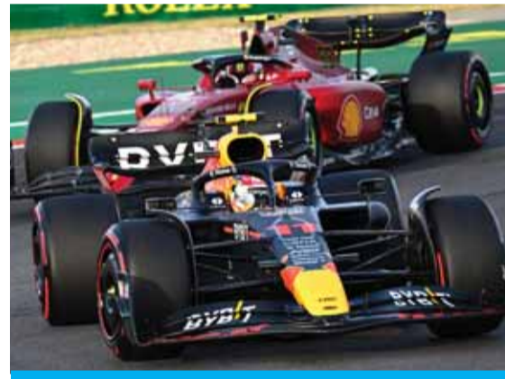
AUSTIN: Red Bull Racing's Mexican driver Sergio Perez (front) and Ferrari's Spanish driver Carlos Sainz Jr make a turn during the qualifying session for the Formula One United States Grand Prix, at the Circuit of the Americas in Austin on October 22, 2022.

said it had been a difficult day. "It's been hard news for everyone - for Red Bull and for the sport and for me - in general, in my career and in my life. It is a very tough day. We missed out in qualifying by a little bit, but there is a race tomorrow and we'll try to do it for him," he said.