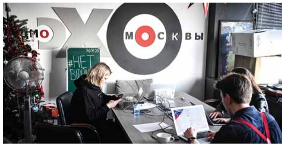
Journalists work at the office of Echo of Moscow radio.