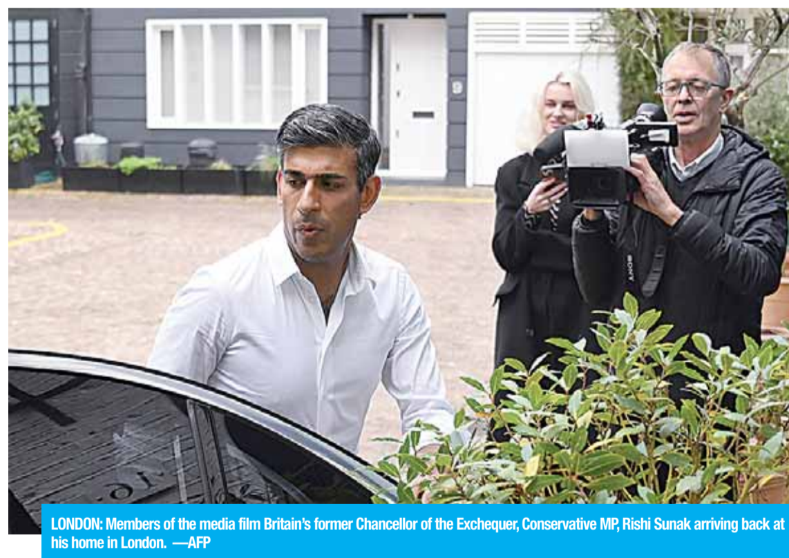
LONDON: Members of the media film Britain's former Chancellor of the Exchequer, Conservative MP, Rishi Sunak arriving back at his home in London.

Johnson himself, speculation has swirled ever since that he would attempt a comeback — though few expected it to happen this quickly. The ever-ebullient Brexit figurehead remains popular with a section of Conservative MPs and the party. But his brand among the wider electorate was severely damaged by his scandal-tainted three-year tenure.