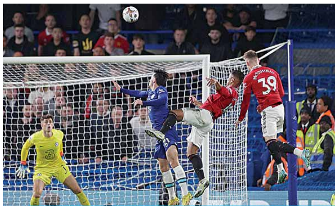
LONDON: Manchester United's Brazilian midfielder Casemiro (2nd right) jumps in a crowd of players to head home their late equalizing goal during the English Premier League football match between Chelsea and Manchester United on October 22, 2022.

It's disappointing because we're 1-0 ahead at the end but over the course of the game a point is about right and I'm not sure if we did enough to win it," Potter said. "A really fighting performance from us, we improved a lot