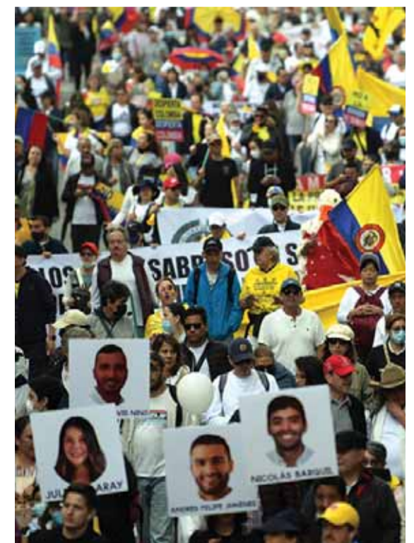
BOGOTA: People protest against a tax reform proposed by the government of leftist President Gustavo Petro, in Bogota, Colombia. — AFP

Former right-wing president Ivan Duque (2018-2022) faced massive protests in 2019, 2020 and 2021. The bloodiest occurred last year, when the then president tried to tax the middle class to deal with the ravages of the pandemic. This sparked violent demonstrations that lasted two months and left 46 dead, including civilians and police, according to the UN. —AFP