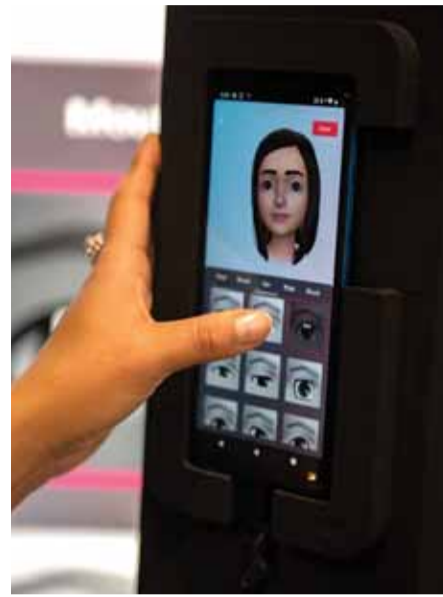
A young woman makes a virtual image of herself at a TikTok stand during the international influencer convention Vidcon in Mexico City on September 23, 2022.

For Sprinz, the #BookTok phenomenon is driven by the fact that TikTok is a visual platform, allowing people to show how they feel about a book. And people being stuck at home during the coronavirus pandemic may have accelerated