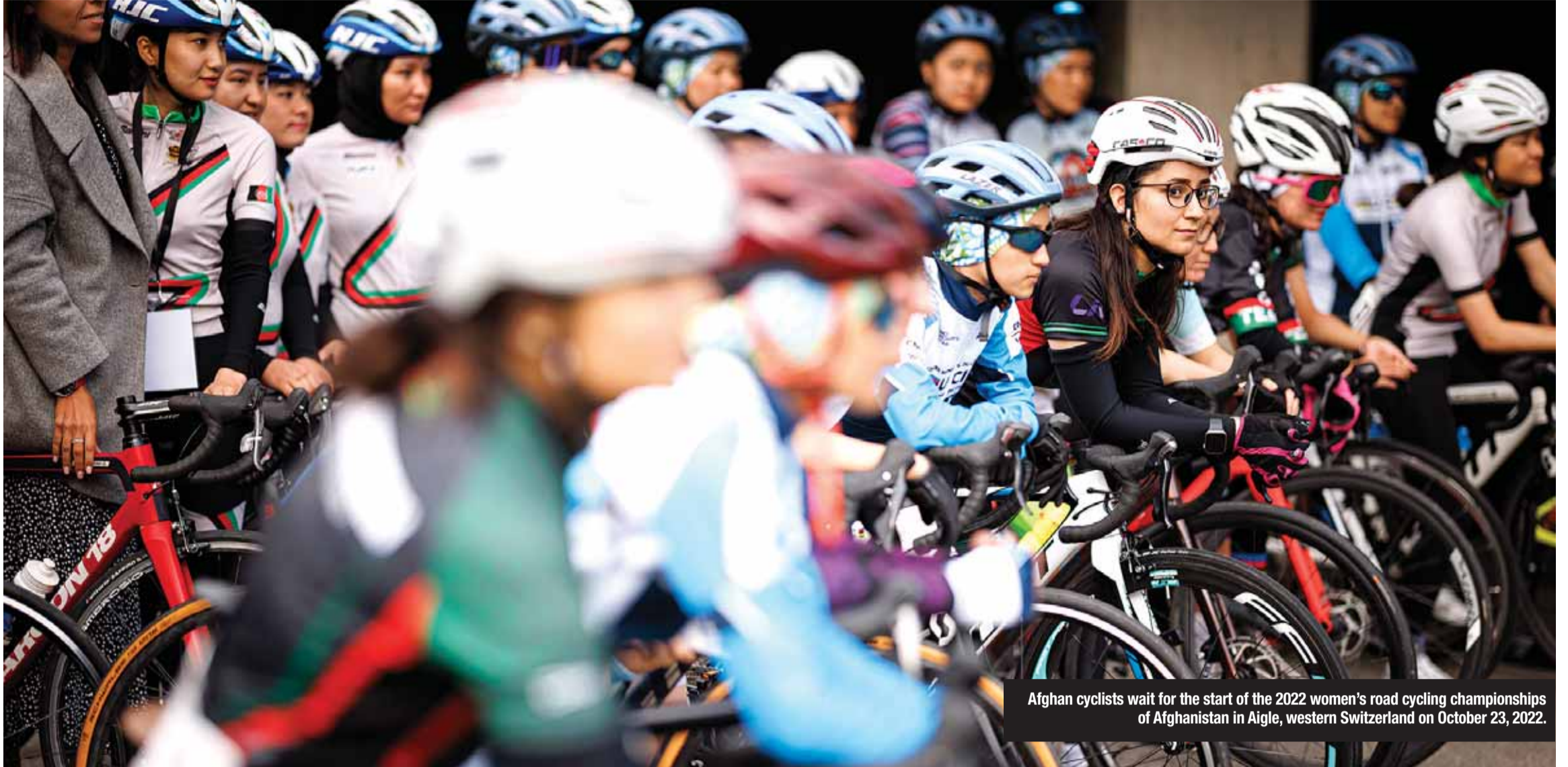
Afghan cyclists wait for the start of the 2022 women's road cycling championships of Afghanistan in Aigle, western Switzerland on October 23, 2022.