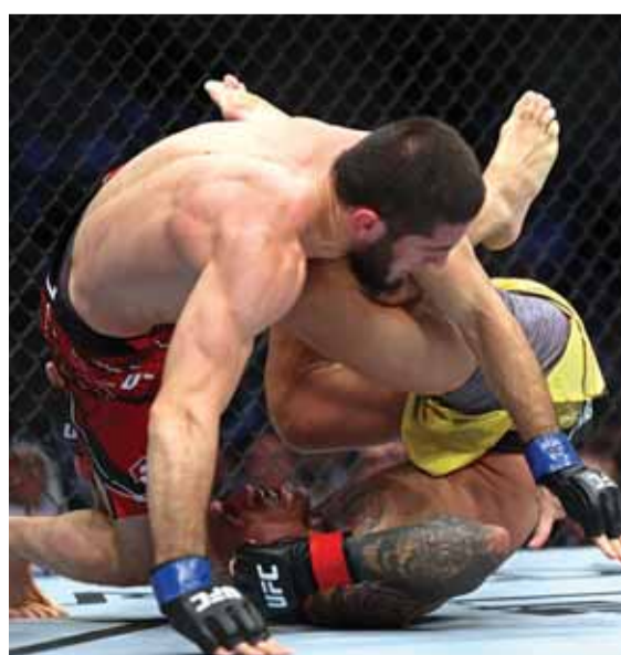
ABU DHABI: Islam Makhachev (left) competes against Charles Oliveira in the lightweight championship at the Ultimate Fighting Championship (UFC) event at the Etihad Arena in Abu Dhabi on October 22, 2022.

"I have trained so hard for this moment," the 31-year-old Makhachev said. "All my life, (since) when I was a kid I have been ready for that moment." Makhachev's 22-1 career has been finely tuned by fellow Russian Khabib Nurmagomedov - arguably the greatest fighter the sport has seen - and the now-retired star was beaming at a performance that mirrored many of his