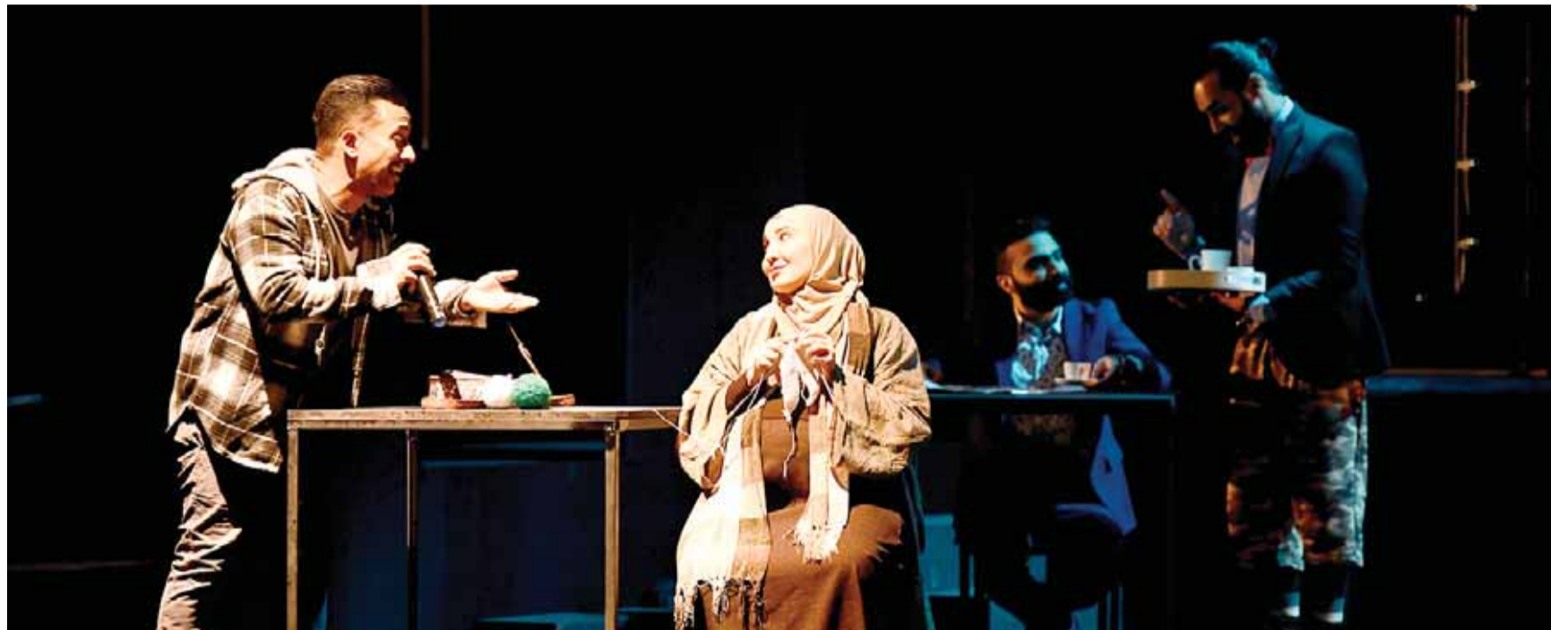
A scene from 'Let's Drink Coffee' drama.

Kuwait Theater Festival 'one of the specialized festivals in Arab world'