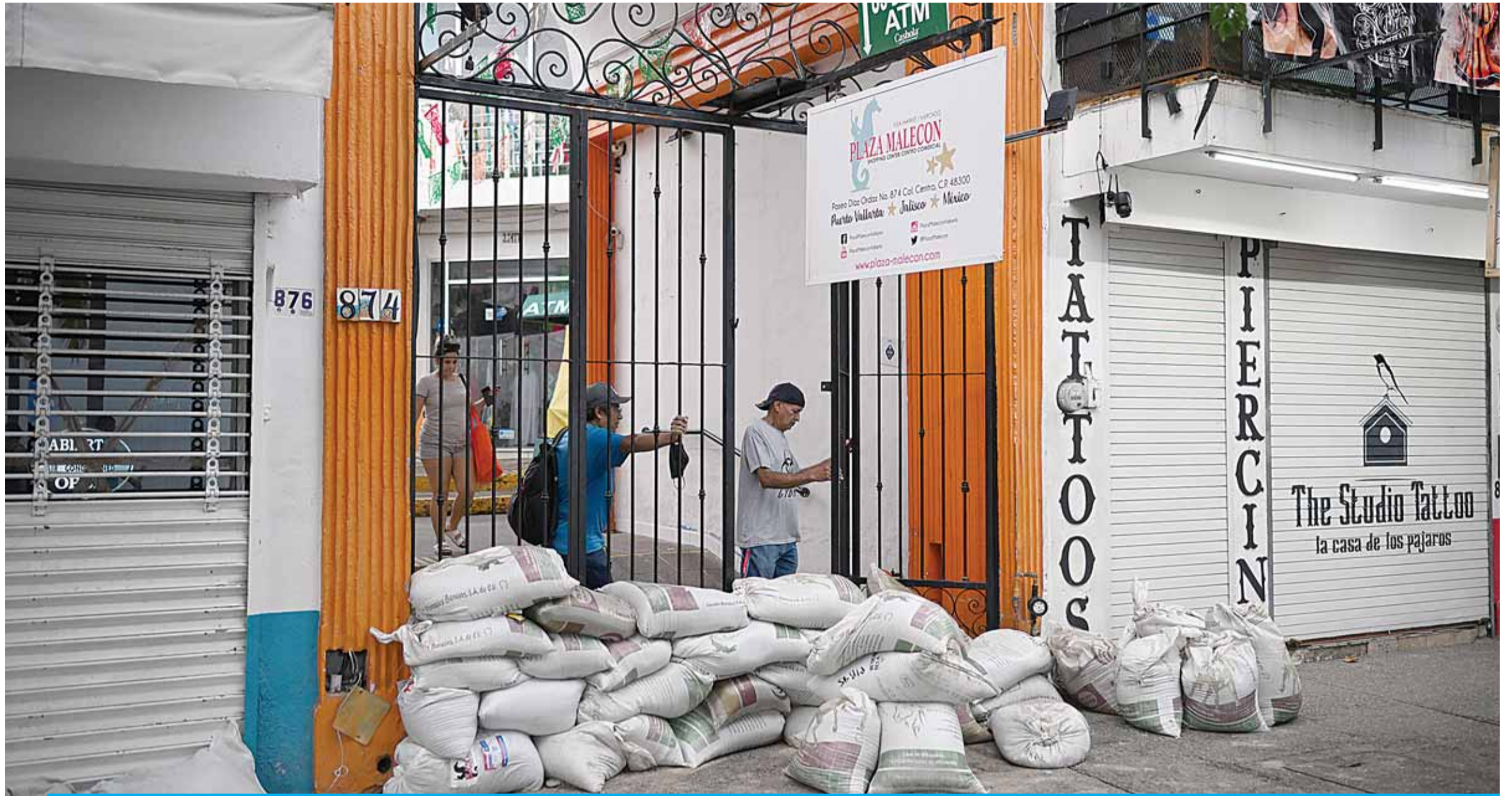
PUERTO VALLARTA, Mexico: Sandbags protect the entrance of a mall before the arrival of Hurricane Roslyn, in the tourist area of Puerto Vallarta, Jalisco State, Mexico.