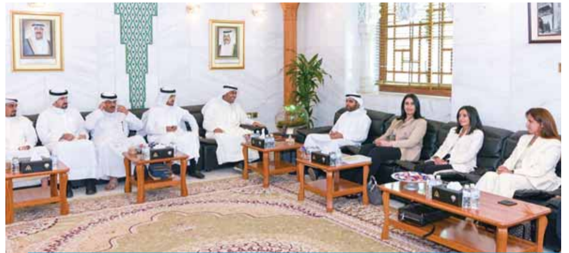
KUWAIT: Municipal Council members discuss a number of development projects

He explained that the most prominent topics related to the bylaws and the structural plan will be sent soon to the council so that it can, through its various committees, approve them through the main session of the municipal council, noting that the council is currently, through the Legal and Financial Committee, discussing Law 33/2016 regarding the Kuwait Municipality, and recommendations will be submitted soon to the minister for municipal affairs for approval.