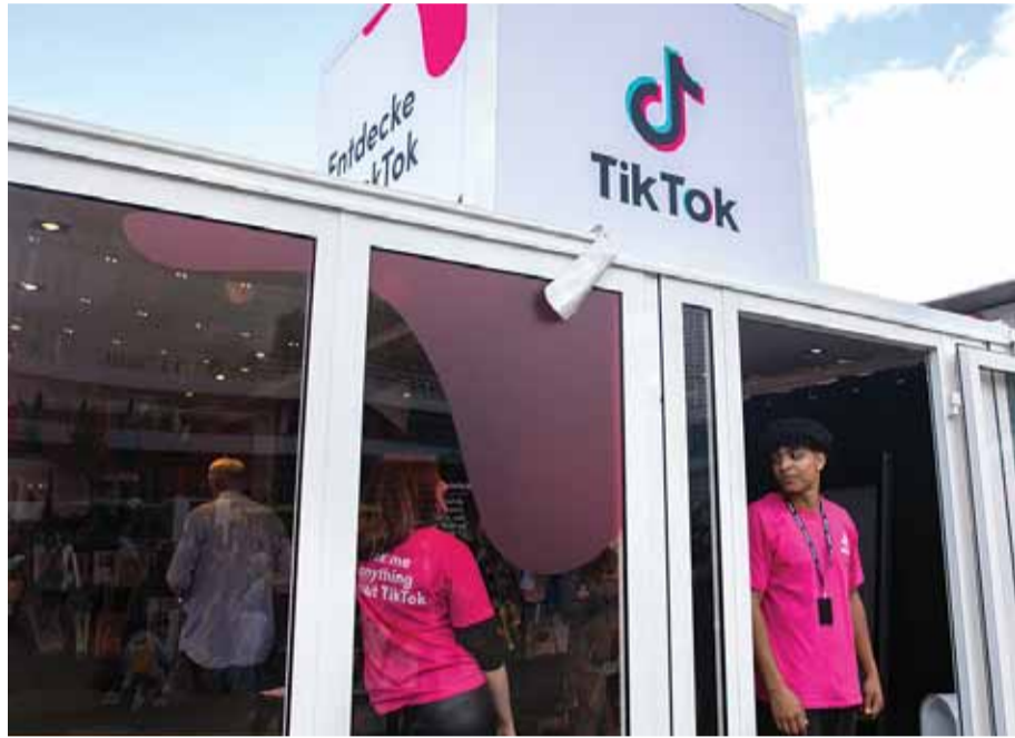
Employees stand at the entrance of a TikTok booth at the Messe fairground during the 23rd Frankfurt Book Fair in Frankfurt am Main on October 22, 2022. This year's edition of the Frankfurt Book Fair takes place until October 23 at the Messe Frankfurt fairground.

She also downplayed the suggestion there was somehow a contradiction between spending more time on social media and trying to promote literature, noting that people read in different ways nowadays, including on e-books and smartphones. But social media alone "cannot make a successful book", she said. "TikTok and #BookTok are a kind of multiplier, and a good opportunity to pass on recommendations for books." But "there must be more to it," she said. "The book must of course be good." — AFP