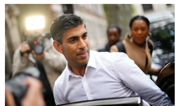
LONDON: Britain's former chancellor of the exchequer, Conservative MP Rishi Sunak, leaves an office on Oct 23, 2022.