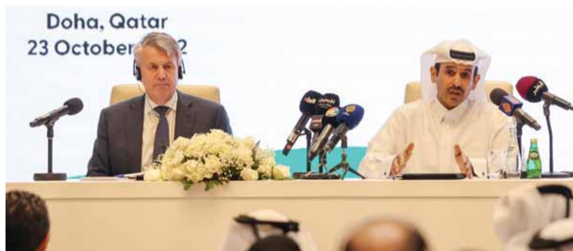
DOHA: Qatar's Minister of State for Energy Affairs and President and CEO of QatarEnergy Saad Sherida Al-Kaabi (right) and Shell's CEO Ben van Beurden hold a signing ceremony at QatarEnergy headquarters in Doha, on October 23, 2022.