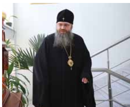
KYIV, Ukraine: Kliment, Bishop of the Ukrainian Orthodox Church, walks in the Kyiv Pechersk Lavra in Kyiv.

Kliment stressed that clerics from all over Ukraine—including territories controlled by separatists—took part in the council, priests from the war zone in the east joining online. "The council was attended by representatives of almost all the dioceses, including those of the East", he said. Their decision, he said, "will be relayed in (Moscow-annexed) Crimea and in the Donbas". Moscow patriarchy clerics play an important role in territories not under Kyiv's control, he said, often acting