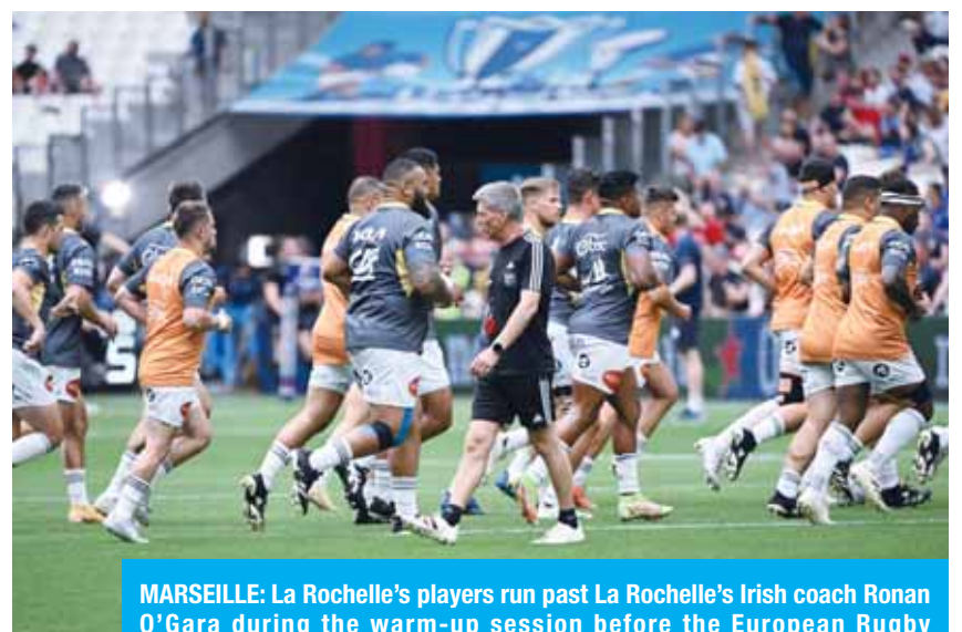
MARSEILLE: La Rochelle's players run past La Rochelle's Irish coach Ronan O'Gara during the warm-up session before the European Rugby Champions Cup, rugby union final between Stade Rochelais (La Rochelle) and Leinster at the Velodrome Stadium in Marseille.

Sexton kicked six penalties to put Leinster into that 18-10 lead, but even then O'Gara said he was not overly concerned. "We're a second-half team, the data says that and as a coach you have to get into that," he said. "We knew then that Leinster's last 20 minutes was where we can get them." O'Gara's plan was shown to be right as La Rochelle dominated the final quarter, Arthur