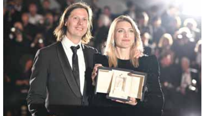
Belgian film director Felix Van Groeningen (left) and Belgian director Charlotte Vandermeersch pose during a photocall after they equally won the Jury Prize for their film "The Eight Mountains (Le Otto Montagne)".