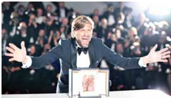
Swedish film director and screenwriter Ruben Ostlund poses with the trophy during a photocall after he won the Palme d'Or for the film "Triangle of Sadness".

"Triangle of Sadness" also proved divisive, with Variety finding it "wickedly funny" while The Guardian calling it a "hammy, unsubtle, easy-target satire". But the final word went to the nine-strong jury, this year led by French actor Vincent Lindon and including two-time Oscar-winning Iranian director Asghar Farhadi and Indian superstar Deepika Padukone. Lindon said they struggled to agree on a winner, but "the entire jury was extremely shocked" by "Triangle of Sadness". To mark the 75th jubilee edition of the festival, a special prize was awarded to Jean-Pierre and Luc Dardenne, who have twice won the Palme d'Or and were back in competition with the well-received migrant drama "Tori and Lokita". —AFP