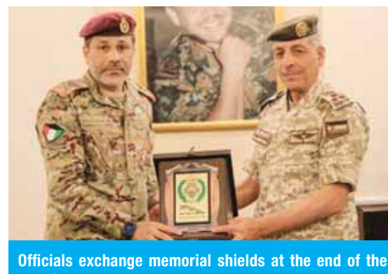
Officials exchange memorial shields at the end of the exercise.