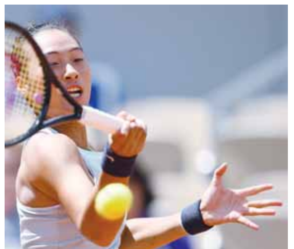
PARIS: China's Zheng Qinwen returns the ball to France's Alize Cornet during their women's singles match on day seven of the Roland-Garros Open tennis tournament on May 28, 2022.

Zheng has been racing up the WTA rankings since the start of 2021 having won 60 of her last 79 matches at all levels. She has reached five second-tier ITF finals in that time and won them all, without dropping a set. Zheng broke into the top 100 in February and is projected to move inside the top 70 for the first time after the French Open.