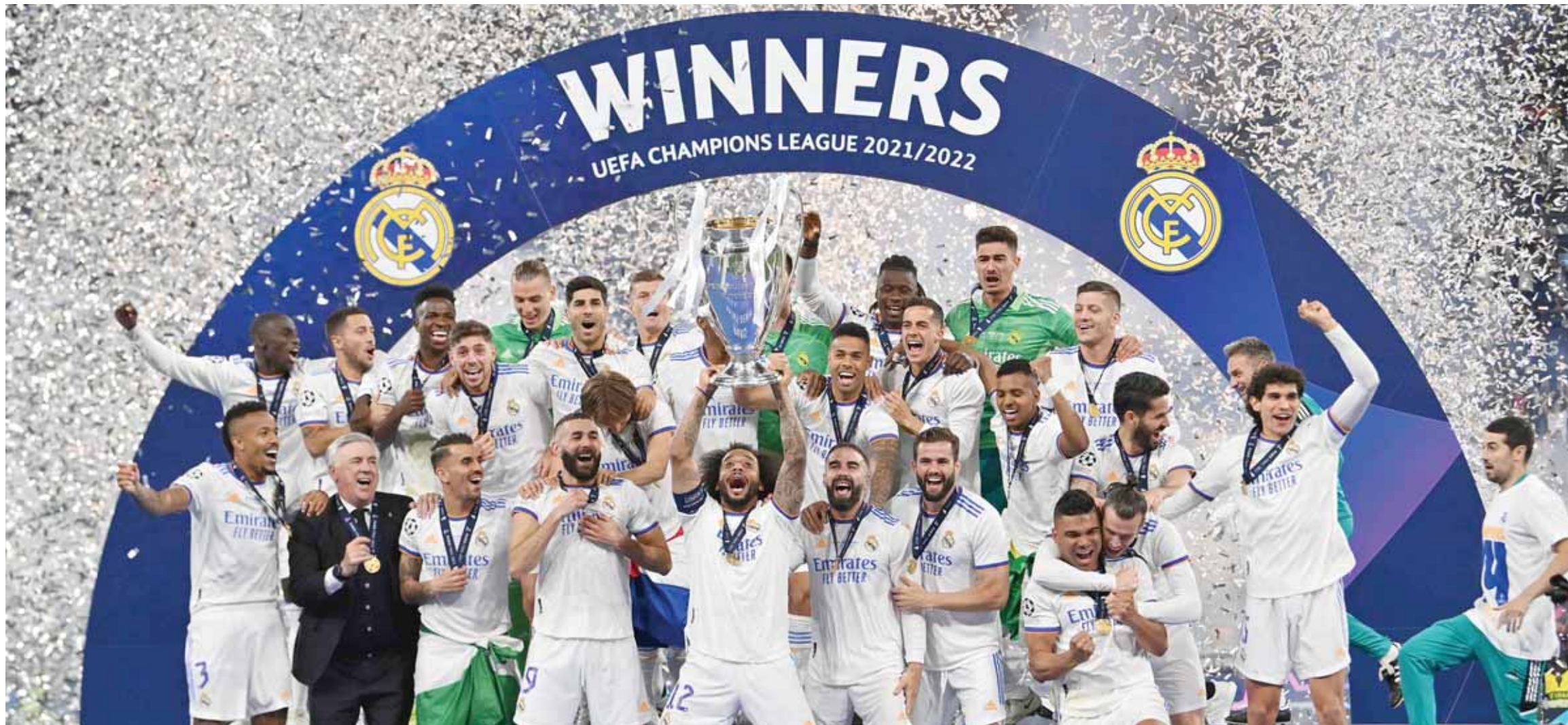
SAINT-DENIS, France: Real Madrid's Brazilian defender Marcelo lifts the Champions League trophy after Madrid's victory in the UEFA Champions League final against Liverpool at the Stade de France north of Paris on May 28, 2022.