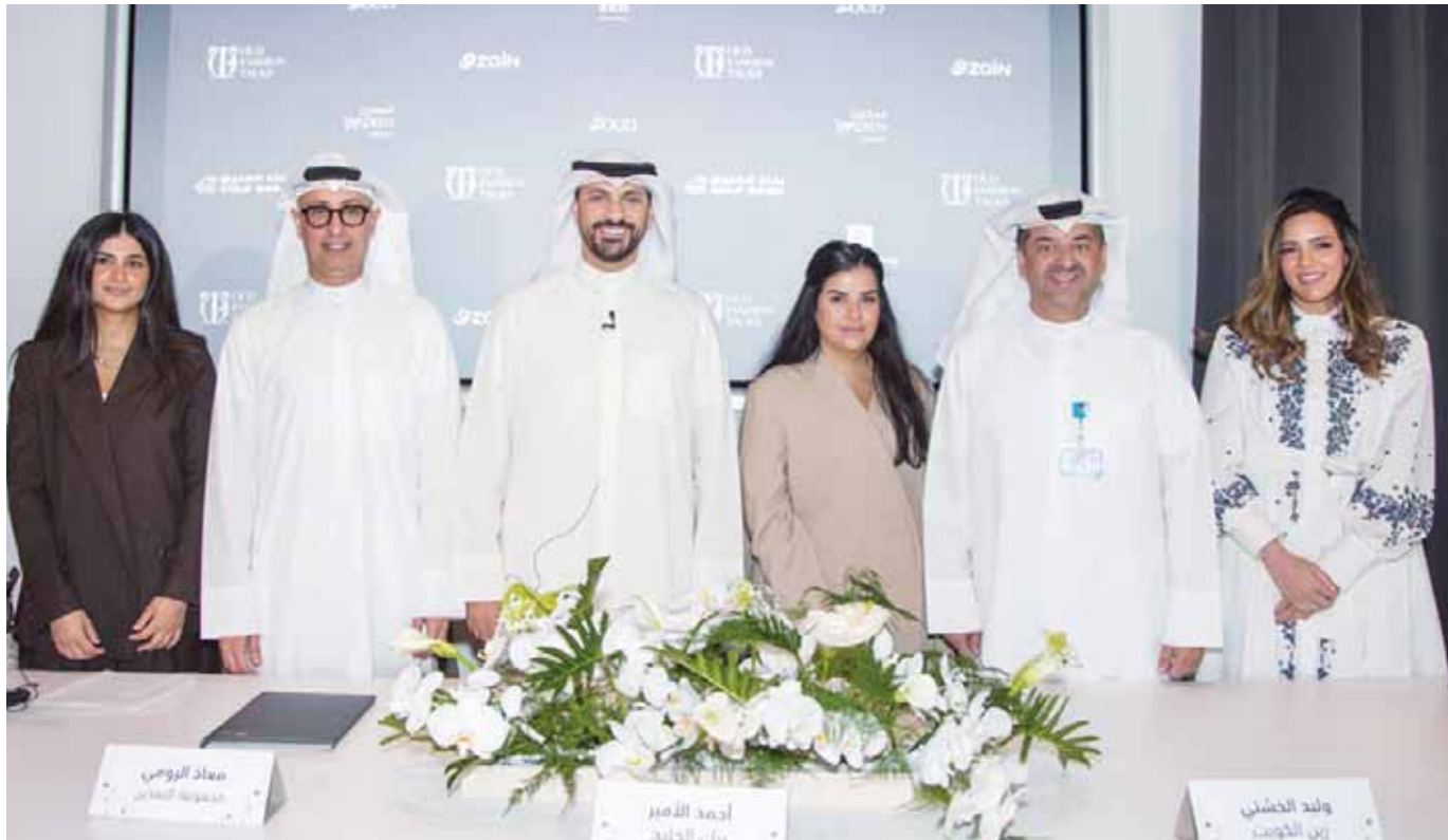
Representatives at the press conference.