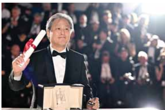
South Korean director Park Chan-Wook poses during a photocall after he won the Best Director prize for the film "Decision to Leave (Hogil Kyolshim)".