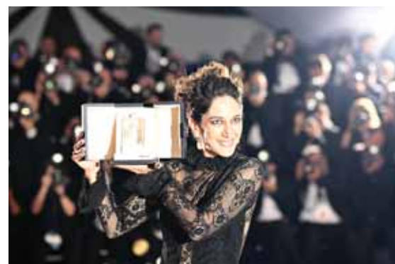
Iranian actress Zar Amir-Ebrahimi poses with her trophy during a photocall after she won the Best Actress Prize for her part in "Holy Spider".