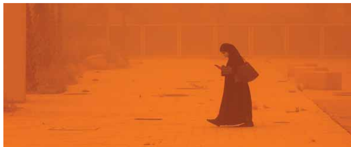
KUWAIT: A woman browses on a phone as she walks amidst a severe dust storm in Kuwait City on May 23, 2022.

"Parents must say their children prefer one form of education over the other. We are now stuck between going back to traditional methods and what changed during the coronavirus period. We must follow the child's curiosity and develop the curriculum. There must be a change even in universities, as exams cause panic and stress, not only for students, but also among parents," she said.