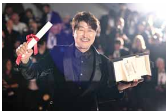
South Korean actor Song Kang-Ho poses with his trophy during a photocall after he won the Best Actor Prize for his part in "Broker (Les Bonnes Etoiles)".