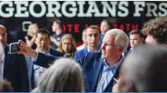
ATLANTA: File photo shows former US Vice President Mike Pence takes a selfie with a supporter at a campaign event for Georgia Governor Brian Kemp on the eve of the general primary election in Atlanta, Georgia.

“It has eroded our standing in the world and stifled the American economy. You know, frankly, Democrats have moved so fast, sometimes I don’t think the left hand knows what the far-left hand is doing.”