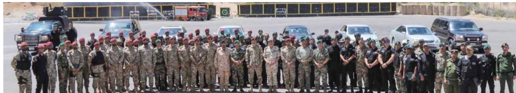
AMMAN: A group photo of officers participating in Shields of Al-Nashama 2 military exercise.