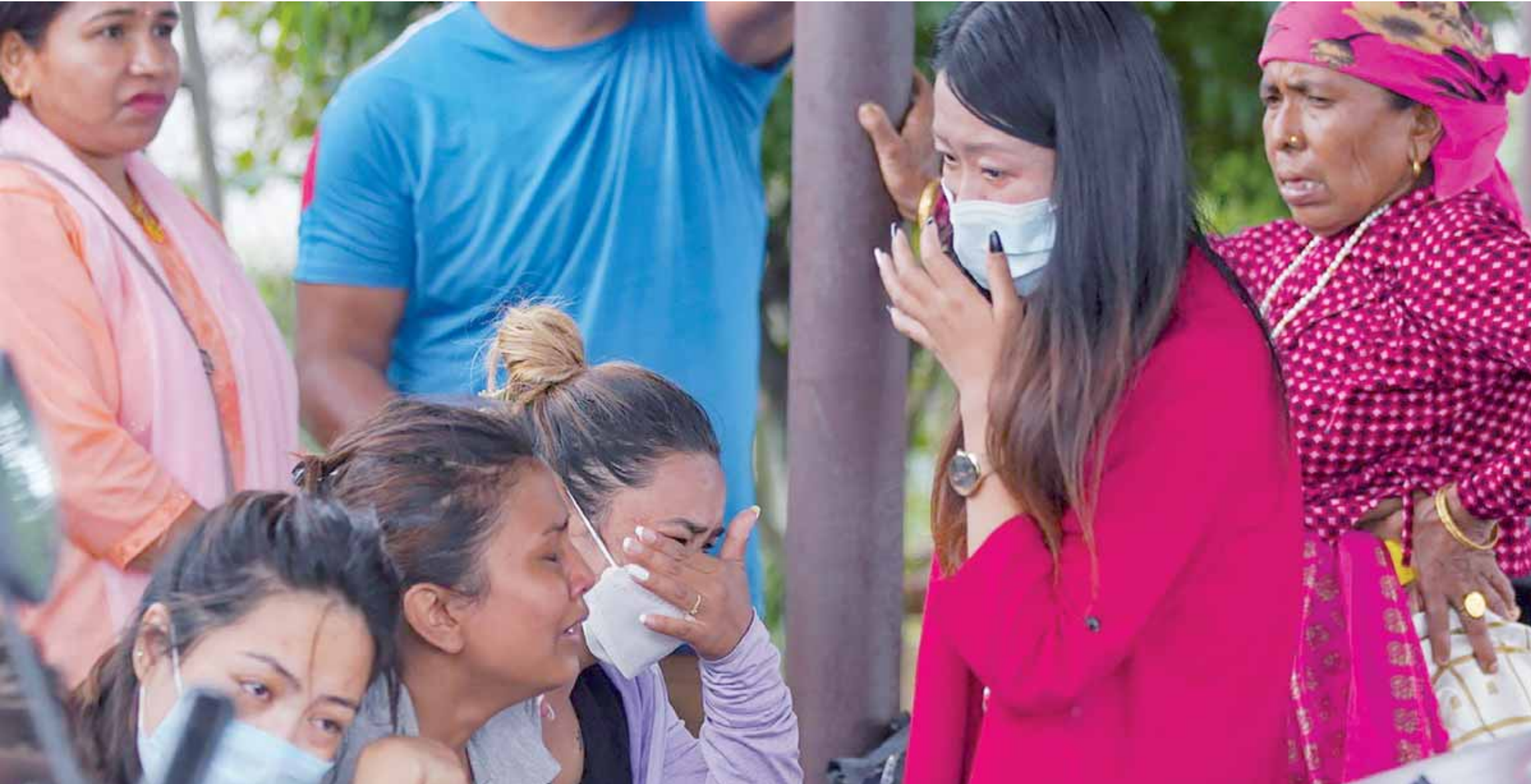
POKHARA, Nepal: Family members and relatives of passengers on board the Twin Otter aircraft operated by Tara Air, weep outside the airport in Pokhara on May 29, 2022.