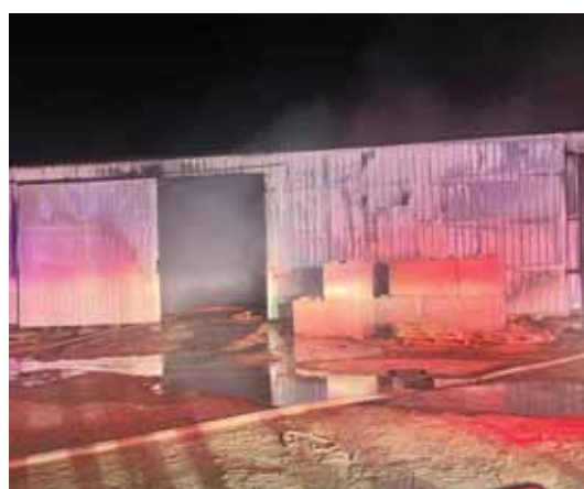
KUWAIT: Firemen responded to a blaze reported in two warehouses in Abdali that belong to the farmers union. No injuries were reported in the incident, Kuwait Fire Force said, adding that an investigation was opened to reveal the cause of the fire.