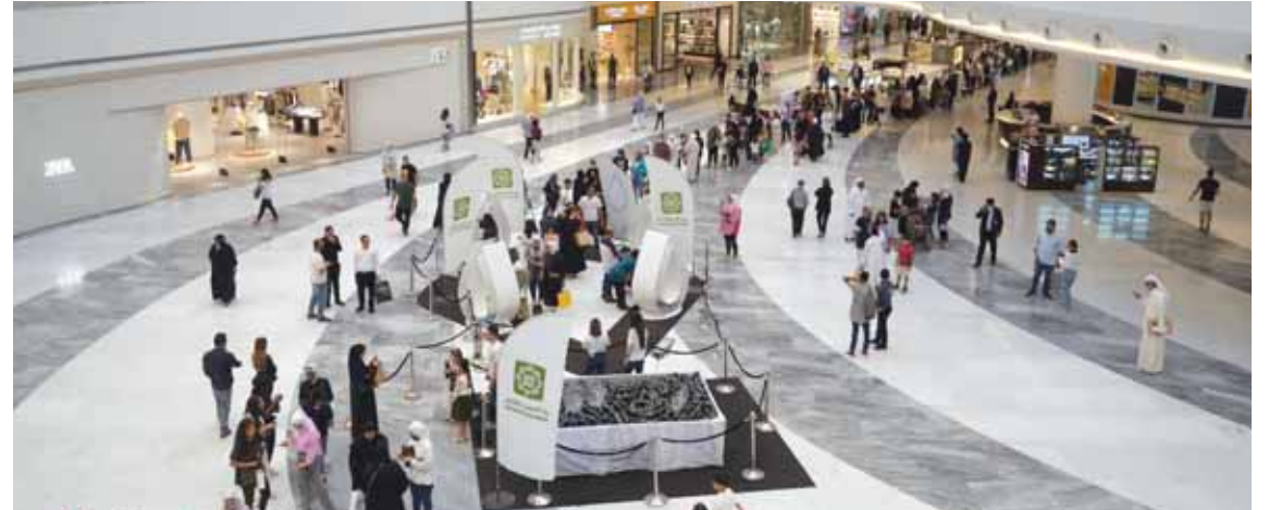
KUWAIT: Large turnout in response to the initiative.

KFH provides 5 products of KFH smart plastic bank cards which are 85.5 percent made of recycled plastic of high global quality and specifications according to the highest environment sustainability standards and certified by specialized global organizations e.g. Visa, MasterCard, IDEAMIA card industry. This industry is the first of its kind in Kuwait as environment friendly initiatives and banking cards compli-