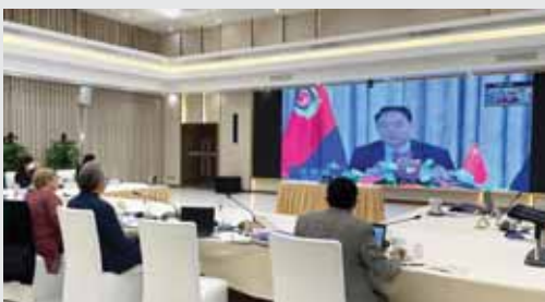
GUANGZHOU, China: Handout image taken and released by the Office of the United Nations High Commissioner for Human Rights (OHCHR) shows UN human rights chief Michelle Bachelet (L) attending a virtual meeting with Vice Minister Du Hangwei of China’s Ministry of Public Security in Guangzhou, as Bachelet begins a long-awaited and controversial trip to Xinjiang. —AFP

Videos posted on social media show wide flooded avenues in several municipalities, collapsing houses and landslides. According to meteorologist Estael Sias, of the MetSul agency, the heavy rains lashing Pernambuco and, to a lesser extent, four other northeastern states, are the product of a typical seasonal phenomenon called “eastern waves.” —AFP