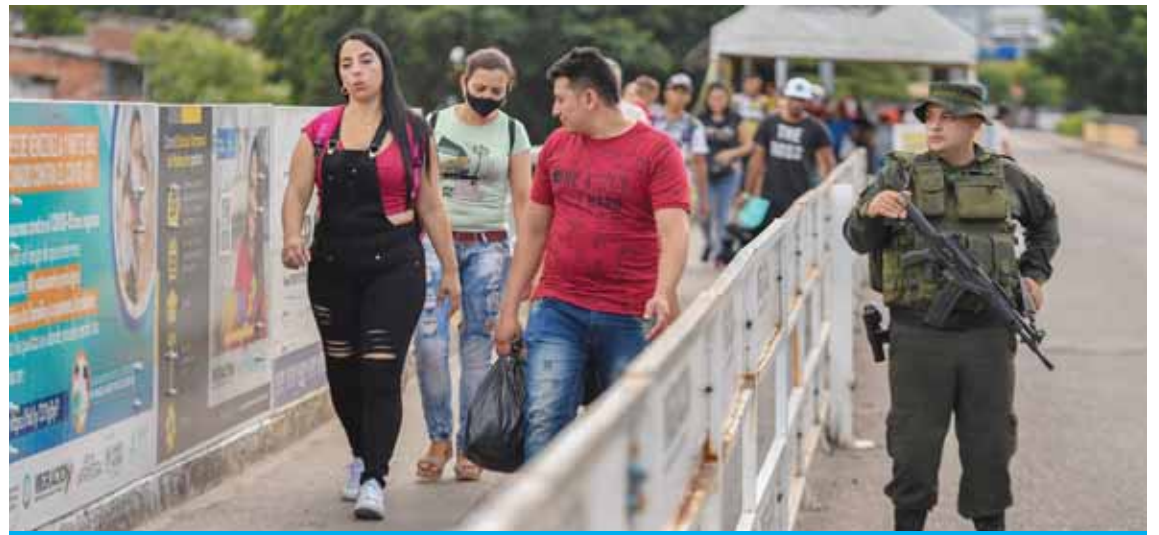
CUCUTA, Colombia: People cross the Simon Bolivar International Bridge to return to San Antonio del Tachira, Venezuela, before the closing of the Colombia-Venezuela border, in Cucuta, Colombia on May 28, 2022, on the eve of the Colombian presidential election.

Petro has promised to address poverty and to make Colombia's economy more environmentally friendly, partly by phasing out crude oil exploration. Gutierrez's focus has been on a "strong