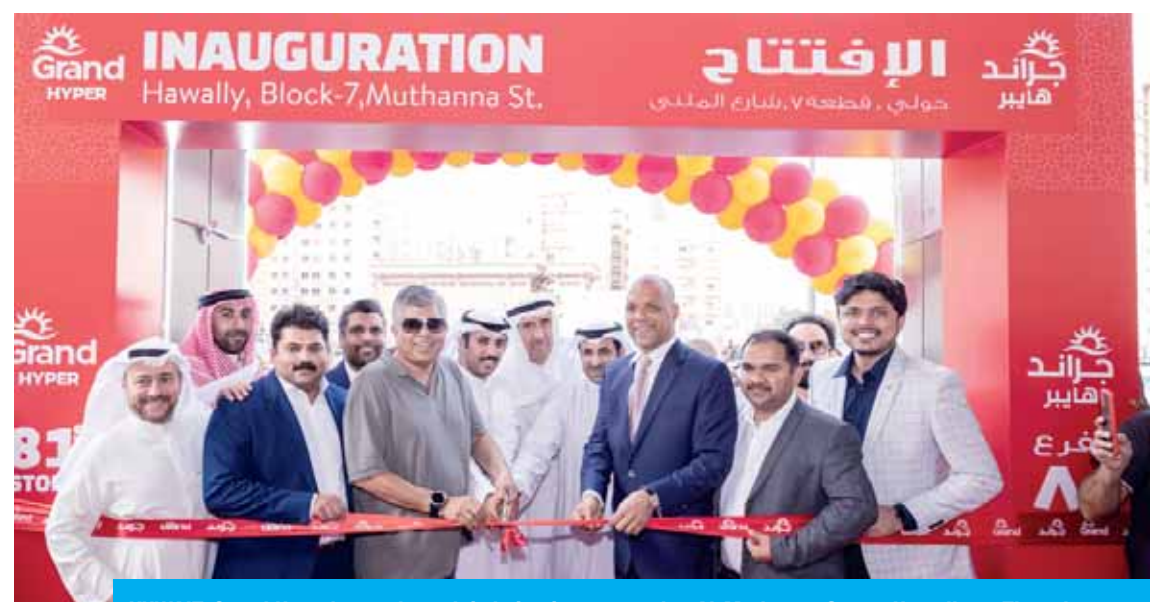
KUWAIT: Grand Hyper's 81st branch is being inaugurated at Al-Muthanna Street, Hawally on Thursday.