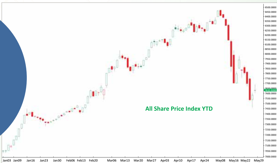
All Share Price Index YTD