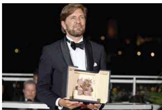
Swedish film director Ruben Ostlund poses during a photocall after he won the Palme d'Or for the film 'Triangle of Sadness' during the closing ceremony of the 75th edition of the Cannes Film Festival in Cannes, southern France.