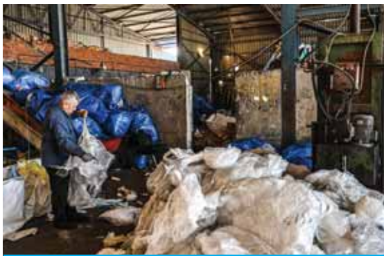
KOCAELI, Turkey: A worker sorts out plastic waste collected at a plastic recycling factory in Kartepe, district of Kocaelion.

Gundogdu finds it curious that "most of these fires are happening at night" and in outlying storage sections of reprocessing centres, away from the machines. In a report published in August 2020, international