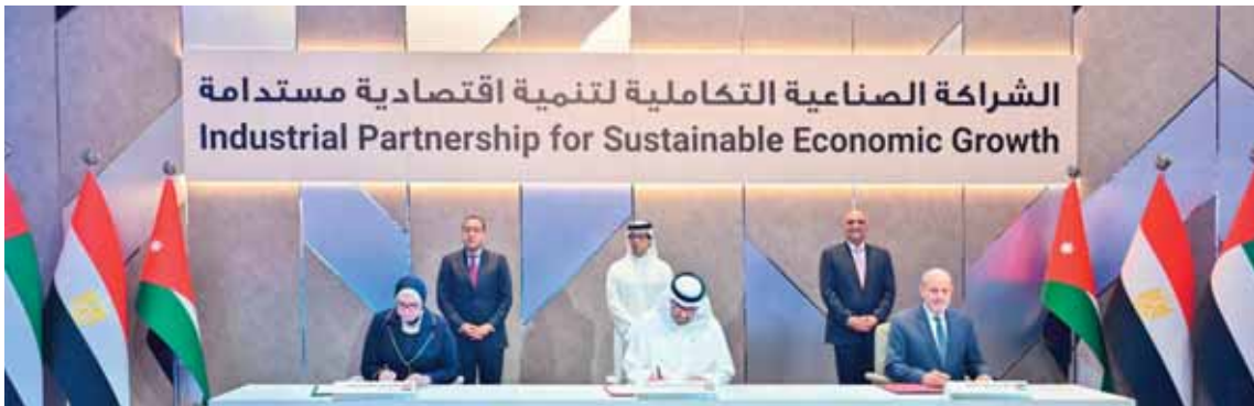
ABU DHABI: The joint conference where details of the Industrial Partnership for Sustainable Economic Growth were revealed.

The partnership was announced in the presence of Sheikh Mansour bin Zayed, Deputy Prime Minister and Minister of Presidential Affairs. "Developing the industrial sector in the participating countries will enable industrial growth in the three nations, diversify the economy and increase the sector's contribution to the gross domestic product," he said, according to the Wam