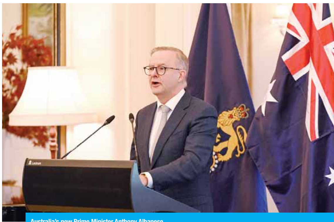
Australia's new Prime Minister Anthony Albanese.