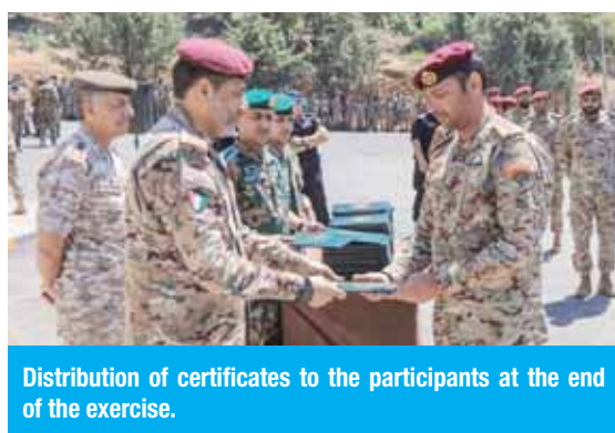
Distribution of certificates to the participants at the end of the exercise.

It added that attendees praised the personnel's top combat performance, their efforts to attain