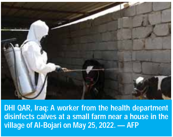
DHI QAR, Iraq: A worker from the health department disinfects calves at a small farm near a house in the village of Al-Bojari on May 25, 2022.

A poor farming region in southern Iraq, the