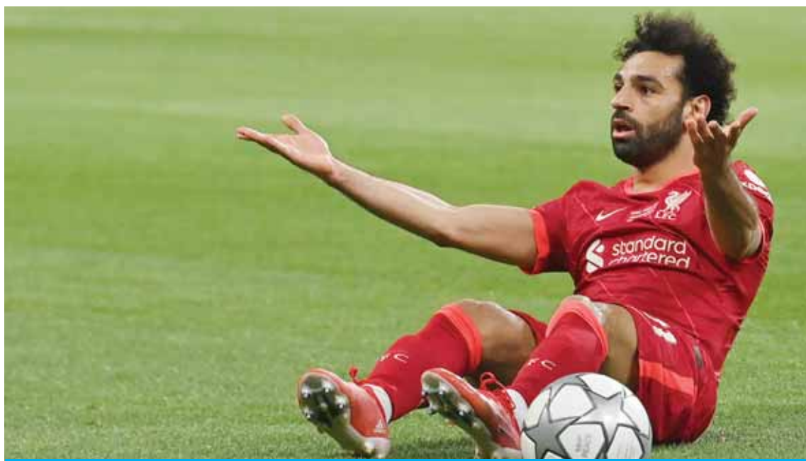
SAINT-DENIS: Liverpool's Egyptian midfielder Mohamed Salah reacts on the pitch after a foul during the UEFA Champions League final football match between Liverpool and Real Madrid on May 28, 2022.

For many in Egypt, where public gatherings are effectively prohibited, football offers a rare avenue for distraction away from daily struggles including a heightened inflation rate which Moody's warned could raise instability and social tensions. On Saturday, fans filled cafes across Cairo, sporting red scarves, waving flags to the Liverpool anthem