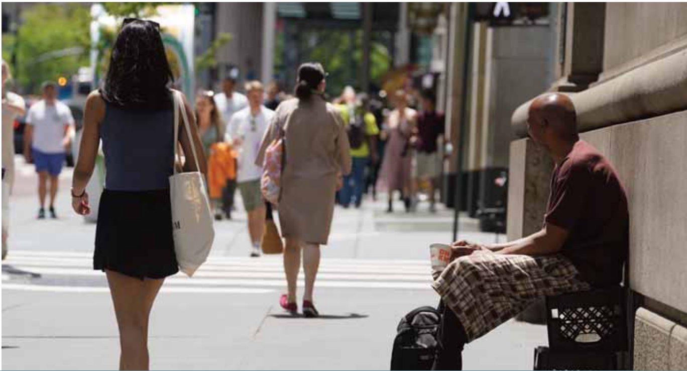
NEW YORK: A person walks down 5th Avenue past a man asking for money in New York, May 27, 2022. Fast-food workers protesting in New York City to demand $20 an hour would have been unthinkable prior to the pandemic, but amid worsening US labor shortage more companies are granting huge pay hikes.