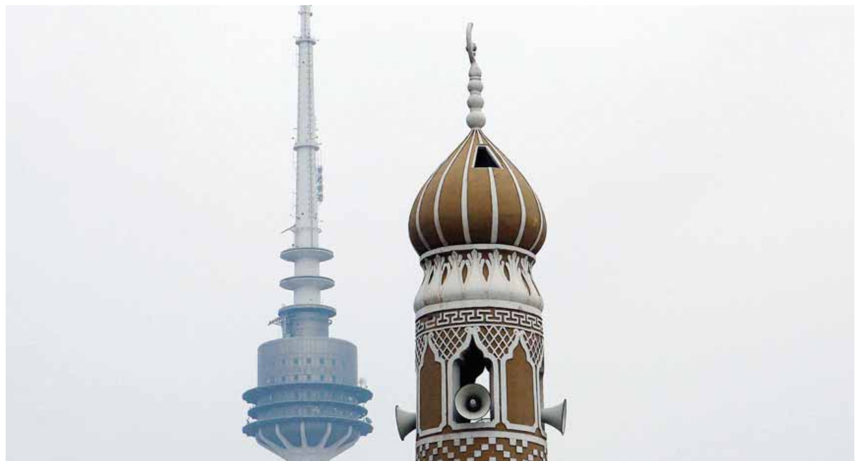
KUWAIT: This file photo shows the minaret of a Kuwait City mosque as the Liberation Tower is seen in the background.