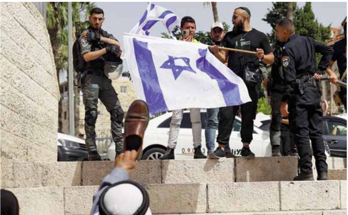
JERUSALEM: A Palestinian man raises a shoe against Zionists waving their national flags at Jerusalem Gate on May 29, 2022.