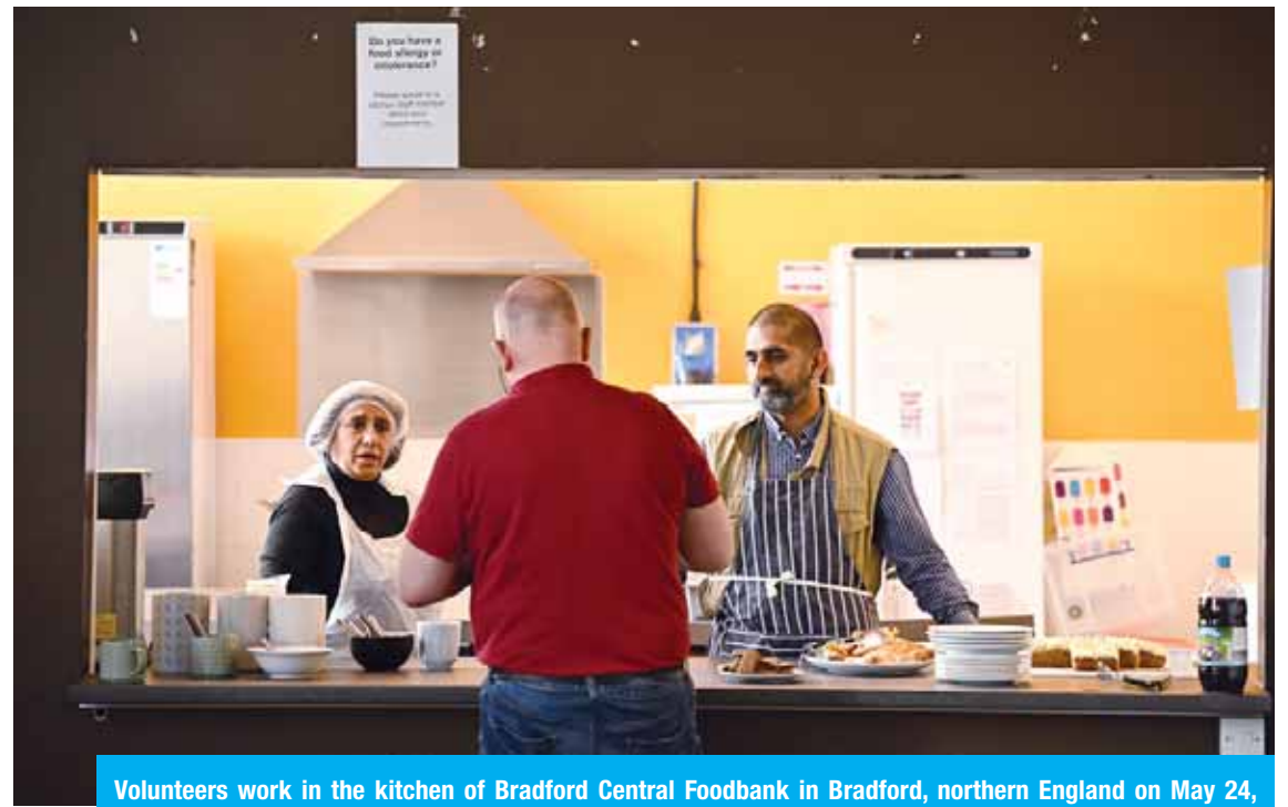
Volunteers work in the kitchen of Bradford Central Foodbank in Bradford, northern England on May 24, 2022.

But in Bradford, as elsewhere, it cannot allay fears that worse to come.