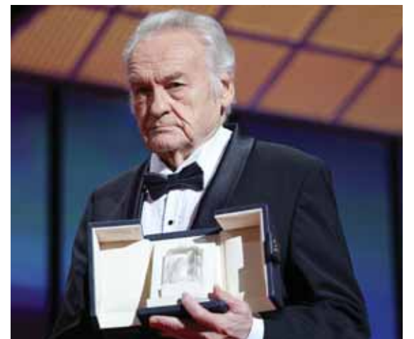
Polish director Jerzy Skolimowski poses on stage after he was equally awarded with the Jury Prize for the film "Eo (Hi-Han)".