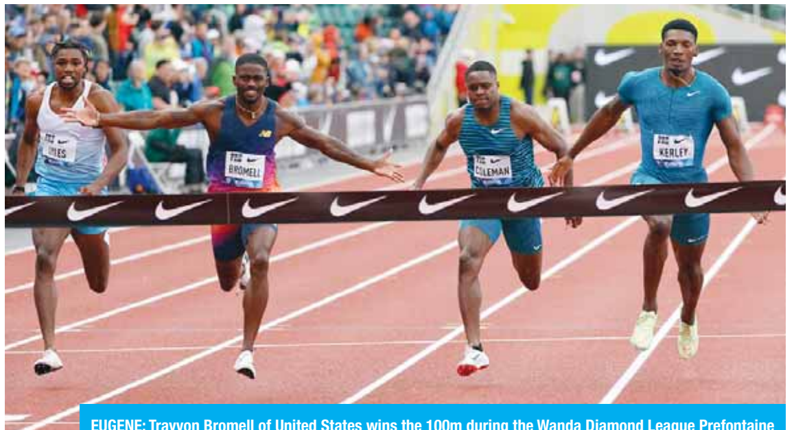
EUGENE: Trayvon Bromell of United States wins the 100m during the Wanda Diamond League Prefontaine Classic at Hayward Field on May 28, 2022 in Eugene, Oregon.

Norman's fastest performance in more than a year was the best in the world in 2022 and carried him to victory over Grenada's 2012 Olympic champion Kirani James (44.02) and Britain's Matthew Hudson-Smith (44.35). Britain's Keely Hodgkinson backed up her victory in Birmingham with a gritty win in the