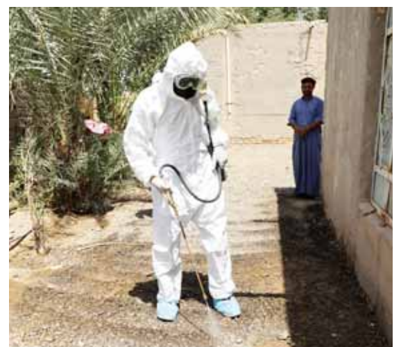
DHI QAR, Iraq: A worker from the health department disinfects the area around a house in the village of Al-Bojari in Iraq's southern Dhi Qar province

Since the virus is "primarily transmitted" to people via ticks on livestock, most cases are among farmers, slaughterhouse workers and veterinarians, the WHO says. "Human-to-human transmission can occur resulting from close contact with the blood, secretions, organs or other bodily fluids of infected persons," it adds. Alongside uncontrolled bleeding,