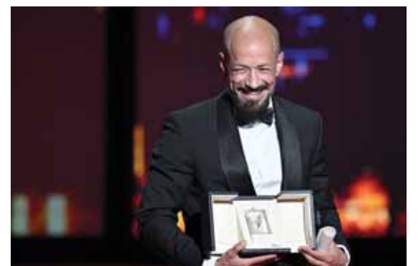
Swedish director Tarik Saleh delivers a speech on stage after he was awarded with the Best Screenplay prize for the film "Boy From Heaven (Walaad Min Al Janna)".