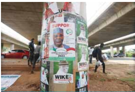
ABUJA, Nigeria: Different banners of Nigeria's opposition party (Peoples Democratic Party) is seen on a wall at the Central Area, Abuja before its National Convention in Abuja, Nigeria on May 28 2022. —AFP

Some Afghan women initially pushed back against the curbs, holding small protests. But the Taliban soon rounded up the ringleaders, holding them incommunicado while denying they had been detained. —AFP