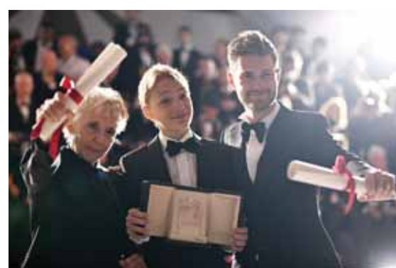
(From right) Belgian director Lukas Dhont, Belgian actor Eden Dambrine pose with his trophy during a photocall after he won equally the Grand Prix for the film "Close" and with French film director Claire Denis for the film "Stars at Noon".

cal tensions in Central America. The third-place Jury Prize was shared between "The Eight Mountains", about a lifelong friendship in the Italian Alps; and the festival's most radical entry, "EO", a movie told entirely from the point of view of a donkey, from 84-year-old Polish legend Jerzy Skolimowski.