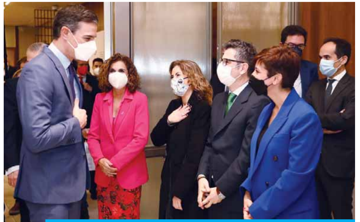
MADRID: Spanish Prime Minister Pedro Sanchez (left) talks with some ministers of his cabinet as he attends a business forum in Madrid on March 28, 2022.

Fishermen also staged a mass strike last week over diesel prices, while the livestock and farming