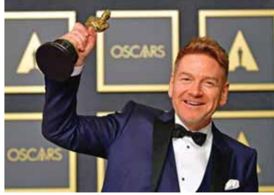
British filmmaker Kenneth Branagh poses with the award for Best Original Screenplay for "Belfast".