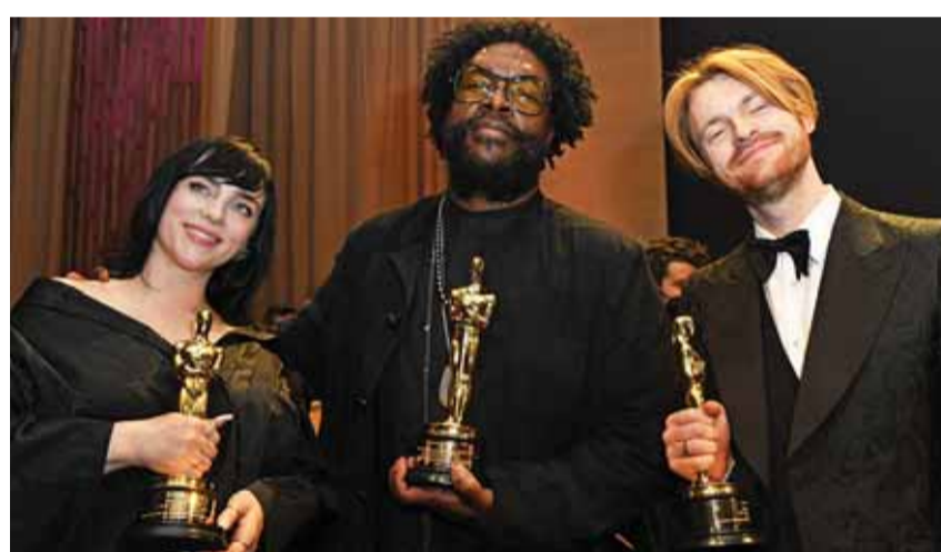
US singer-songwriter Billie Eilish (left) poses with the award for Best Music (Original Song) for "No Time to Die", US musician Questlove poses with the award for Best Documentary Feature for "Summer of Soul", and US singer-songwriter Finneas O'Connell poses with the award for Best Music (Original Song) for "No Time to Die".