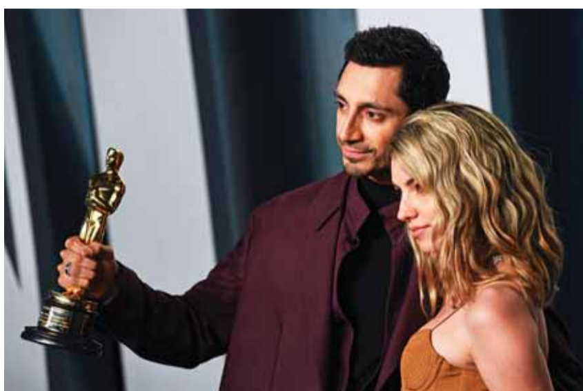
British actor Riz Ahmed (left) holds his award for Best Live Action Short Film for "The Long Goodbye", alongside his wife Fatima Farheen Mirza.