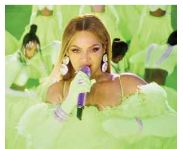
US singer-songwriter Beyonce performs during the 94th Oscars at the Dolby Theatre in Hollywood, California.