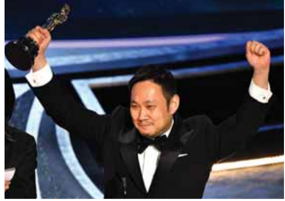
Japanese director Ryusuke Hamaguchi accepts the award for Best International Feature Film for "Drive My Car" onstage.