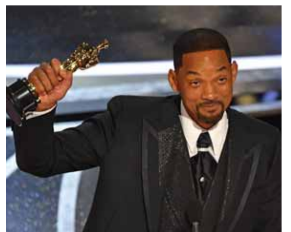
US actor Will Smith accepts the award for Best Actor in a Leading Role for "King Richard" onstage during the 94th Oscars at the Dolby Theatre in Hollywood.