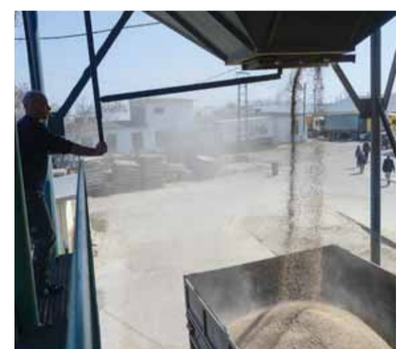
IZMAIL, Ukraine: A truck is loaded with wheat in Bogatoye village on March 24, 2022.

"They have realized that what was maybe unthinkable before the past month has now become