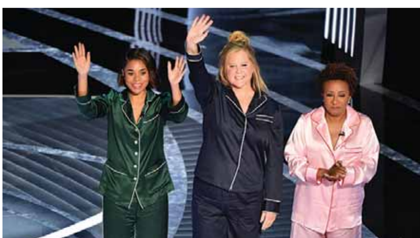
US actress Regina Hall (left), US actress and comedian Amy Schumer (center) and US actress and comedian Wanda Sykes speak onstage.

One of the night's more touching moments came at its finale, as Lady Gaga accompanied Liza Minnelli, in a wheelchair, to announce the best picture winner. The 76-year-old Minnelli-who won best actress for "Cabaret!" which was released 50 years ago-exclaimed: "Oh that's so exciting!" When Minnelli stumbled over her lines, Gaga gently lent over and said "I've got you," before the veteran star announced "CODA" as the night's historic final winner. — AFP