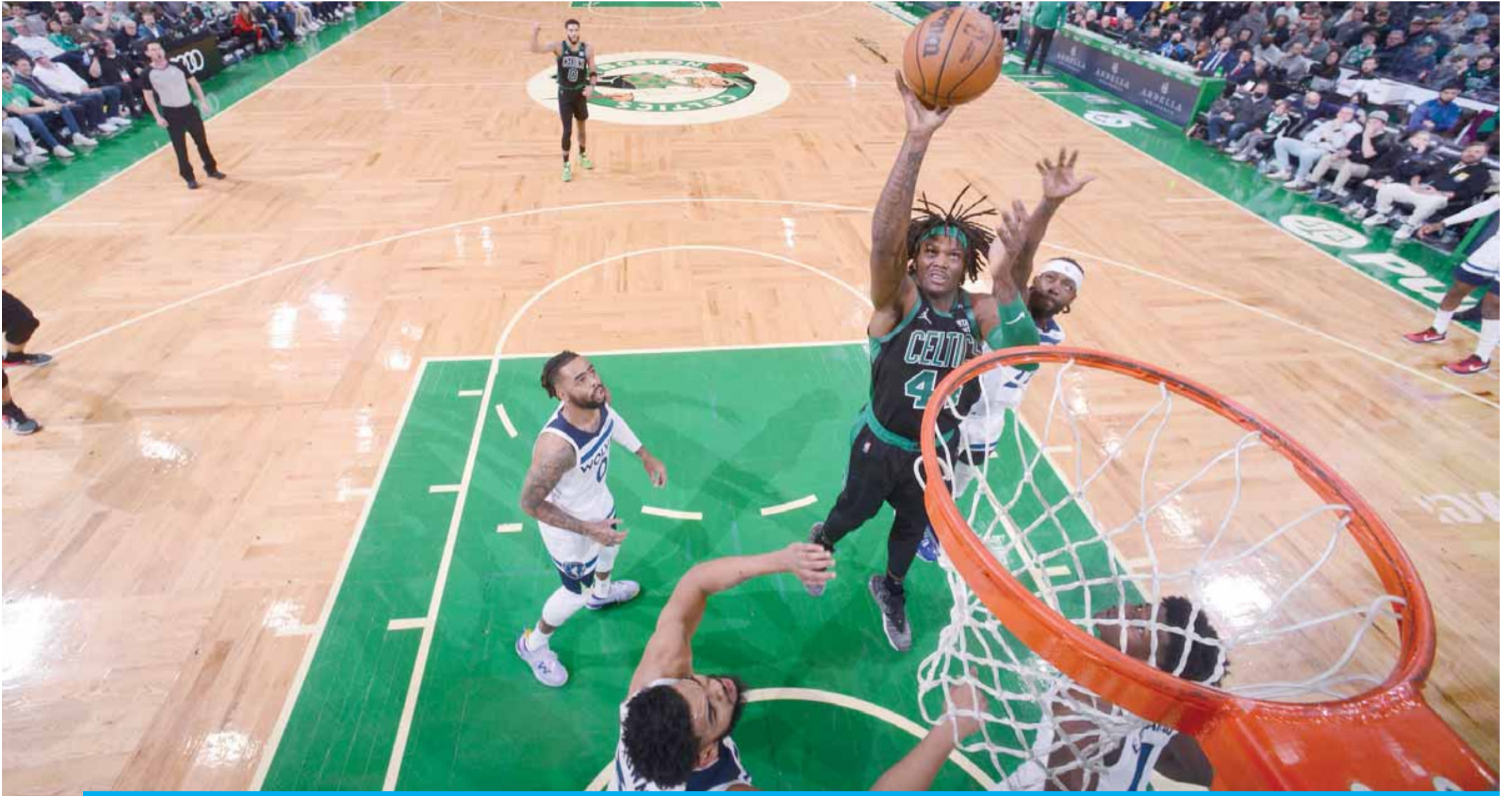
BOSTON: Robert Williams III #44 of the Boston Celtics shoots the ball during the game against the Minnesota Timberwolves on March 27, 2022.