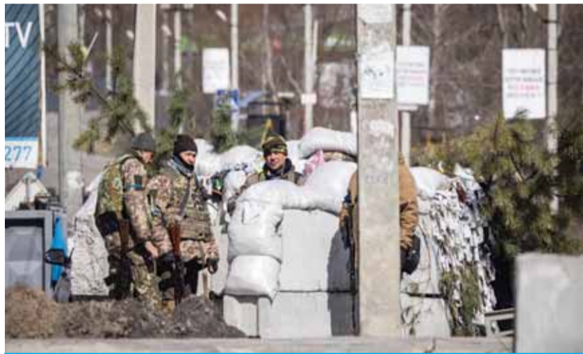
STOYANKA: Volunteers take position at a checkpoint in Stoyanka, on March 27, 2022, amid Russian invasion of Ukraine.

The village was still being targeted by sniper fire, mortars and shelling, much of it coming from the surrounding woods, said the volunteer, asking not to be named. Of the residents who have braved the fighting to stay, many are running short of food. A surprise arrival at the scene is Ostapets'