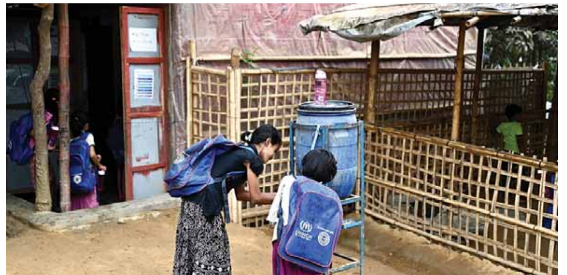
KUTUPALONG, Bangladesh: In this picture taken on March 27, 2022, Rohingya refugee children collect drinking water in a school in Kutupalong refugee camp in Ukhia. Bangladesh has shut the largest private school for Rohingya refugees, officials said on March 28.