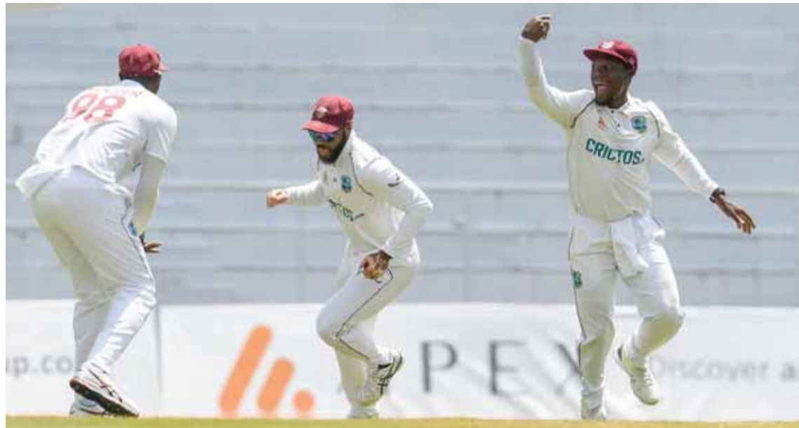
ST GEORGE'S: John Campbell (center) and Nkrumah Bonner (right) of West Indies celebrate the dismissal of Joe Root of England during the 3rd day of the 3rd and final Test between West Indies and England at Grenada National Cricket Stadium on March 26, 2022.

Former England captain Mike Atherton, however, was adamant his position as skipper was "untenable". "As was obvious to anyone who was present in Australia, and should have been obvious to anyone who wasn't, Root has reached the end of the road as captain," Atherton wrote in The Times.