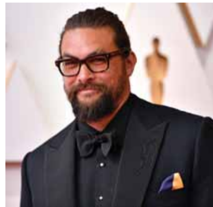
US actor Jason Momoa

Much has been made of what Hollywood's A-listers could do to show sup-