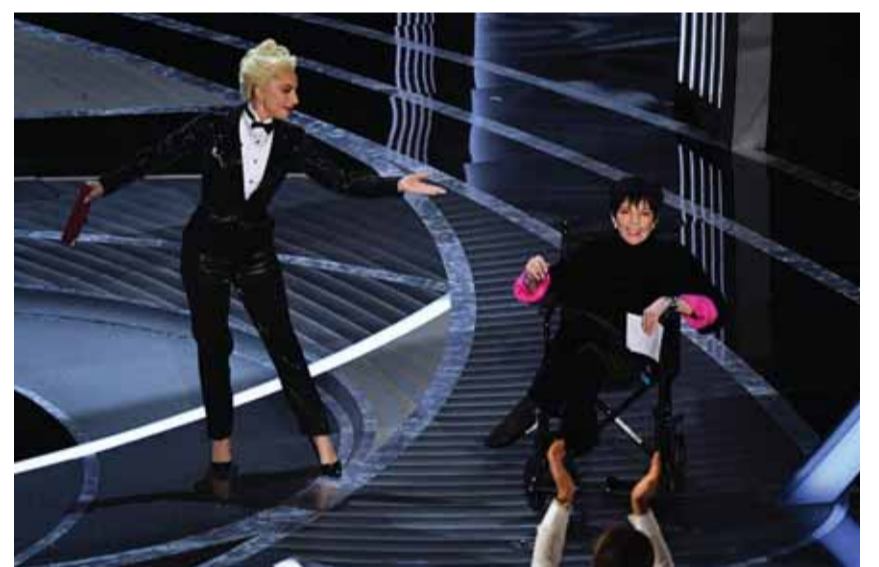
US actress-singer Lady Gaga (left) and US actress Liza Minnelli announce the Best Picture award onstage during the 94th Oscars at the Dolby Theatre in Hollywood.