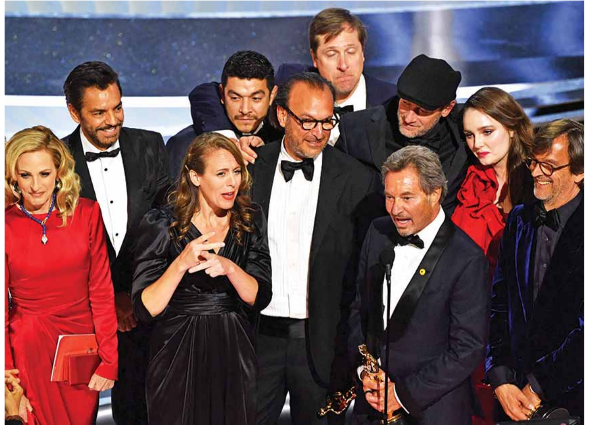
"CODA" cast and crew accept the award for Best Picture for "CODA" onstage during the 94th Oscars at the Dolby Theatre in Hollywood, California.