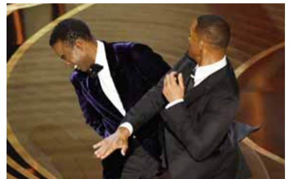
HOLLYWOOD, California: US actor Will Smith slaps US actor Chris Rock onstage during the 94th Oscars at the Dolby Theatre on March 27, 2022.