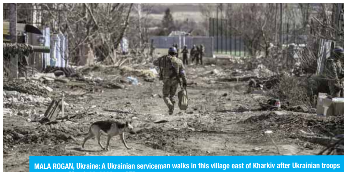
MALA ROGAN, Ukraine: A Ukrainian serviceman walks in this village east of Kharkiv after Ukrainian troops retook it on March 28, 2022.