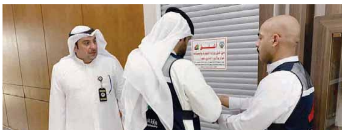
KUWAIT: Commerce and Industry Ministry inspectors closed a store in Sharq area for violating the law by displaying counterfeit goods. Inspectors confiscated a large quantity of bags and clothes with famous labels.