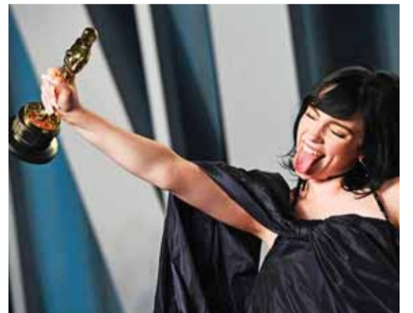
US singer-songwriter Billie Eilish holds the award for Best Music (Original Song) for "No Time to Die".