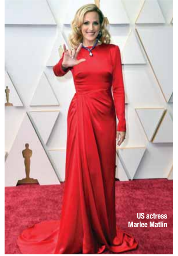
US actress Marlee Matlin