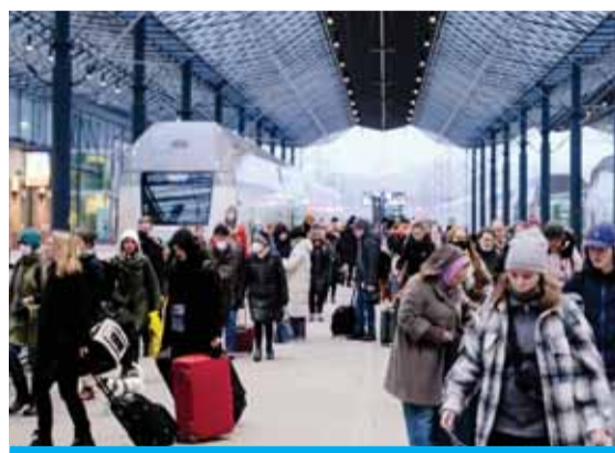
HELSINKI: Passengers disembark from the last Allegro train from St Petersburg, Russia, at the central railway station in Helsinki, Finland on March 27, 2022.

Since the February 24 invasion, around 700 passengers a day have packed the trains to Finland, with the service remaining open at the request of