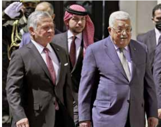
(Left) Bahrain's Foreign Minister Abdullatif bin Rashid Al-Zayani, Egypt's Foreign Minister Sameh Shoukry, Zionist Foreign Minister Yair Lapid, US Secretary of State Antony Blinken, Morocco's Foreign Minister Nasser Bourita and UAE Foreign Minister Sheikh Abdullah Al-Nahyan pose for a group photo following their Negev meeting in the kibbutz of Sde Boker on March 28, 2022. (Right) Palestinian President Mahmoud Abbas welcomes King Abdullah II of Jordan ahead of a meeting in Ramallah in the occupied West Bank on March 28, 2022.

SDE BOKER: US Secretary of State Antony Blinken and the top diplomats of the Zionist entity and four Arab states wrapped up a landmark meeting Monday vowing to boost cooperation, which the Zionist entity said would send a strong message to its arch foe Iran. The talks brought together for the first time on Zionist soil the foreign ministers of the United Arab Emirates, Bahrain and Morocco - which all normalized ties with the Jewish state in 2020 - and of Egypt, a country formally at peace with the Zionist entity since 1979.