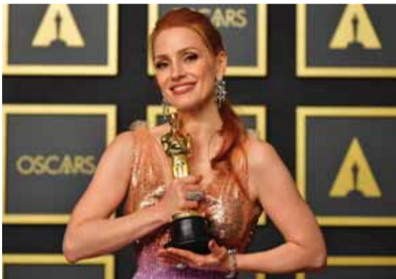
US actress Jessica Chastain poses with the award for Best Actress in a Leading Role for her performance in "The Eyes of Tammy Faye" in the press room.