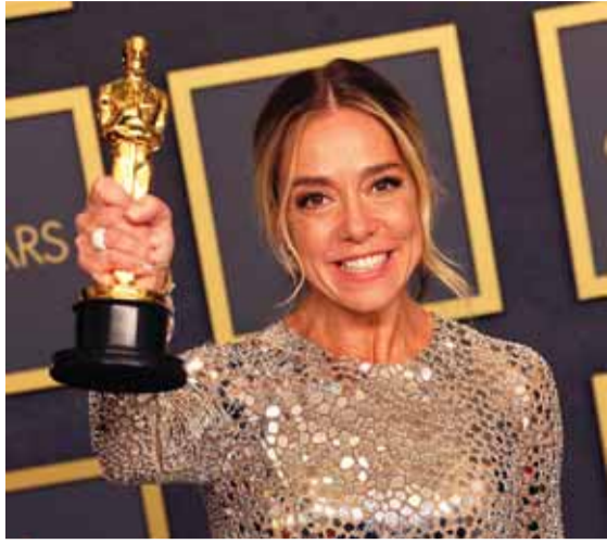
Sian Heder, winner of the Writing (Adapted Screenplay) award for 'CODA' poses in the press room.