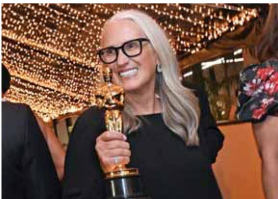
New Zealand Director Jane Campion poses with the award for Directing "The Power Of The Dog".