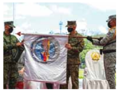
US, Philippines kick off their largest ever war games