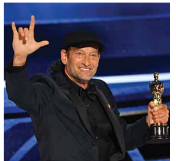
US actor Troy Kotsur accepts the award for Best Actor in a Supporting Role for "CODA" onstage.

"CODA" beat out rivals in the best picture category including the bookies' favorite "The Power of the Dog" by Jane Campion, acclaimed family memoir "Belfast" from Kenneth Branagh, and Steven Spielberg's remake musical "West Side Story." Other films in the category were Leonardo DiCaprio vehicle "Don't Look Up," sci-fi blockbuster "Dune," tennis biopic "King Richard," Japanese road movie "Drive My Car," Los Angeles love letter "Licorice Pizza" and mid-20th century carnival noir "Nightmare Alley." Heder also won the Oscar for best adapted screenplay.