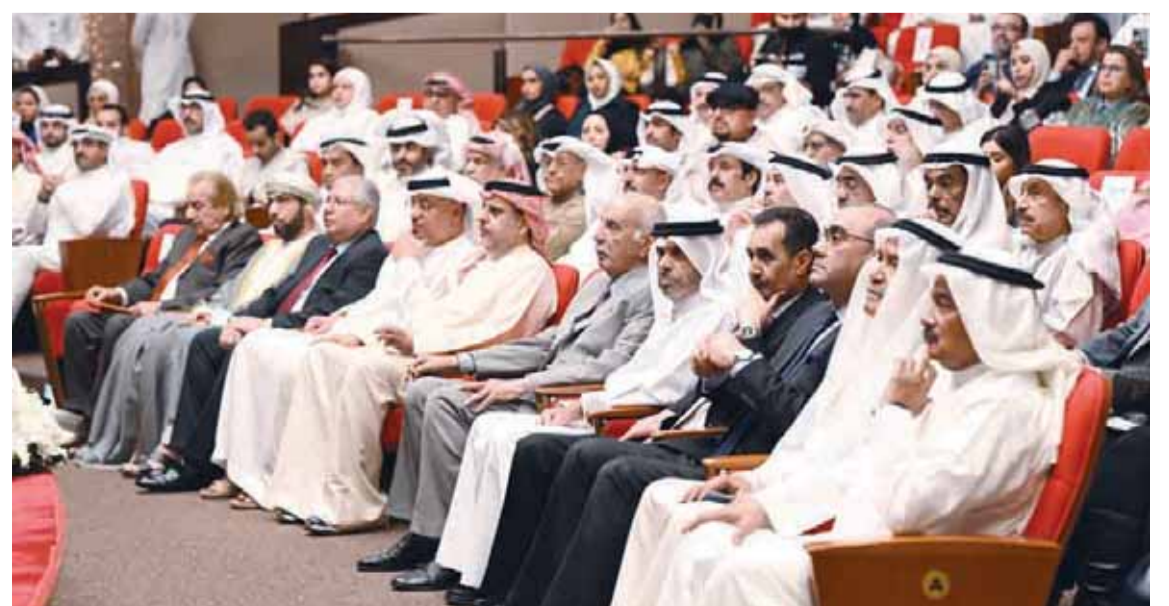
KUWAIT: Media and arts personalities are awarded during the third edition of the Kuwaiti Media Day ceremony on Sunday.

media should improve further in the future, and we are working on developing it," he said after the awards ceremony.