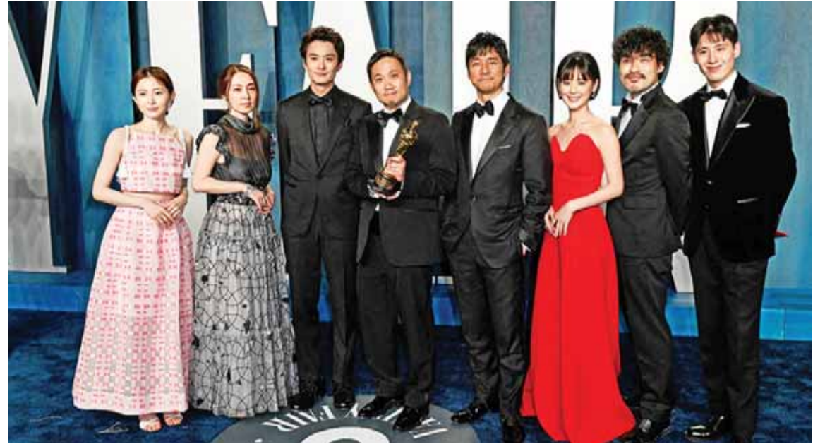
Japanese director Ryusuke Hamaguchi (center) poses with the award for Best International Feature Film for "Drive My Car", alongside the cast.