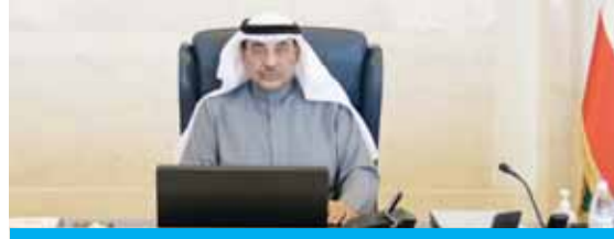
HH the Prime Minister Sheikh Sabah Khaled Al-Sabah

The Minister of Foreign Affairs Sheikh Dr Ahmed Nasser Al-Mohammed Al-Sabah informed the