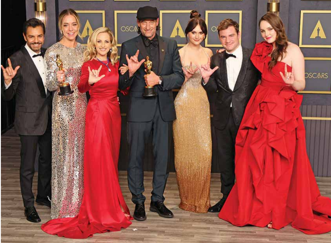
(From left) Eugenio Derbez, Sian Heder, Marlee Matlin, Troy Kotsur, Emilia Jones, Daniel Durant and Amy Forsyth, winners of the Best Picture award for 'CODA', pose in the press room at the 94th Annual Academy Awards at Hollywood and Highland.