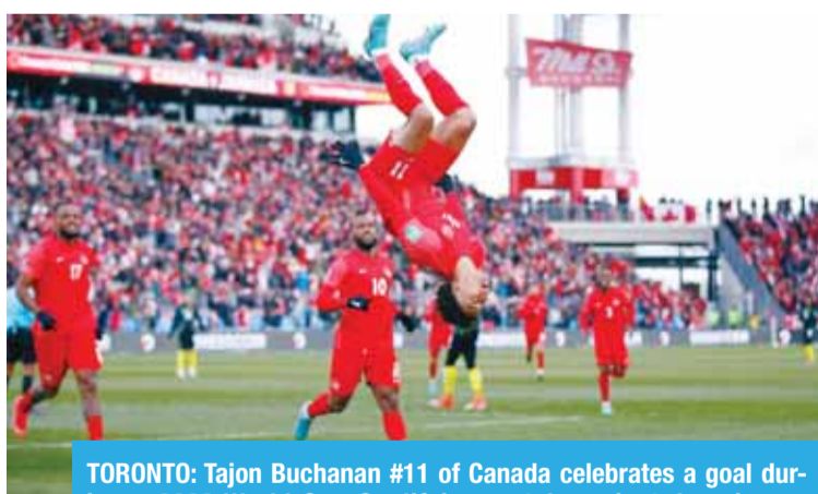
TORONTO: Tajon Buchanan #11 of Canada celebrates a goal during a 2022 World Cup Qualifying match against Jamaica on March 27, 2022.

After a dominant qualifying campaign had left them three points clear with two games remaining, Canada needed only a point from Sunday's fixture to assure themselves of qualification. That objective was never in doubt as Canada went on the attack from the whistle. Larin could have opened the scoring after only five minutes, but his shot after Jonathan David's surging run and pass was well saved by Jamaican goalkeeper Andre Blake. But Larin made no mistake in the