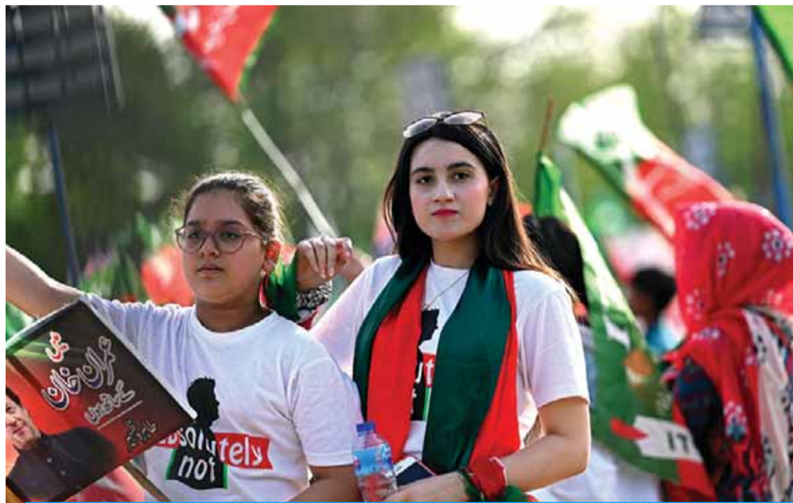
ISLAMABAD: Supporters of ruling Pakistan Tehreek-e-Insaf (PTI) party attend a rally being addressed by Pakistan's Prime Minister Imran Khan, in Islamabad on March 27, 2022.

Two travel agents AFP contacted also confirmed they had stopped issuing tickets to solo women travellers. "Some women who were travelling without a male relative were not allowed to board a Kam Air flight from Kabul to Islamabad on Friday," a passenger who was on that flight told AFP. An Afghan woman with a US passport was also not allowed to board a flight to Dubai on Friday, another source said. The Taleban have already banned inter-city road trips for women travelling alone, but until now they were free to take flights. The Taleban have promised a softer version of the harsh Islamist rule that characterised their first stint in power from 1996 to 2001. But since August, they have rolled back two decades of gains made by Afghanistan's women. Women have been squeezed out of most government jobs and secondary school education, as well as ordered to dress according to a strict interpretation of the Quran.—AFP