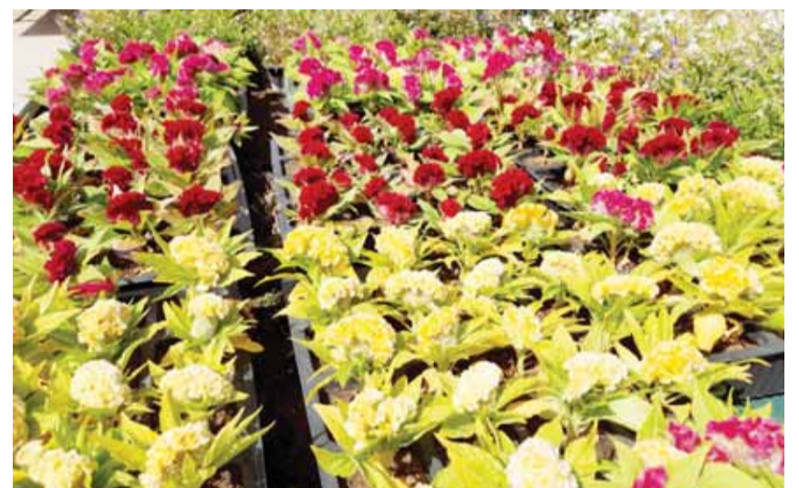
KUWAIT: Photos show summer flowers at nurseries in Al-Rai.