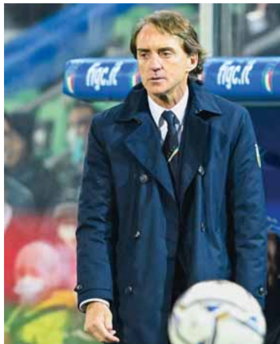
Italy's coach Roberto Mancini

"I'm still young, my aim is to win a European