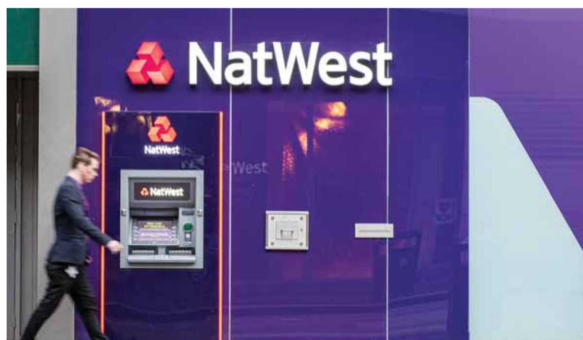
LONDON: A man walks past a branch of the NatWest bank in London. Britain announced Monday that it has ceded control of bailed out bank giant NatWest.

But the war in Ukraine is a chance for China to reduce its reliance on the US dollar. The Wall Street Journal reported that Beijing is in talks with Saudi Arabia to buy oil in yuan instead of dollars. "China will continue to build foundations for the future," Bao said. "The financial decoupling is accelerating." — AFP