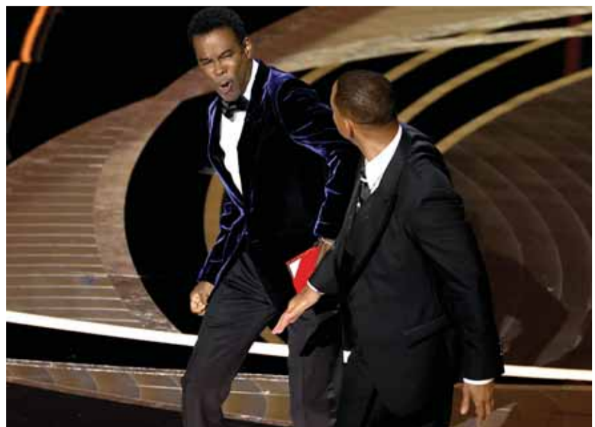
Chris Rock and Will Smith are seen onstage.