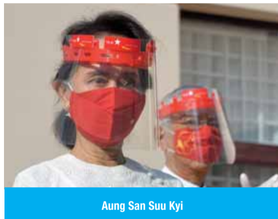
Aung San Suu Kyi

"We are worried because we haven't been able to see her." Former president Win Myint-charged alongside Suu Kyi-appeared at the court on Monday via video conferencing, the source added. Suu Kyi and her personal staff have been fully vaccinated against COVID-19 since being taken into military custody, her lawyer told AFP last July.