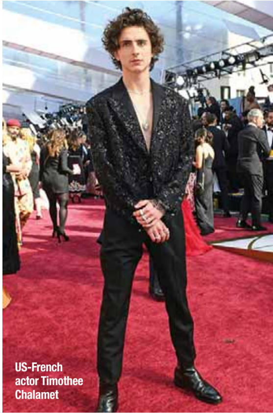
US-French actor Timothee Chalamet