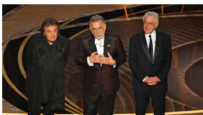
US actor Al Pacino (left), US director Francis Ford Coppola (center) and US actor Robert De Niro speak onstage during the 94th Oscars at the Dolby Theatre in Hollywood.