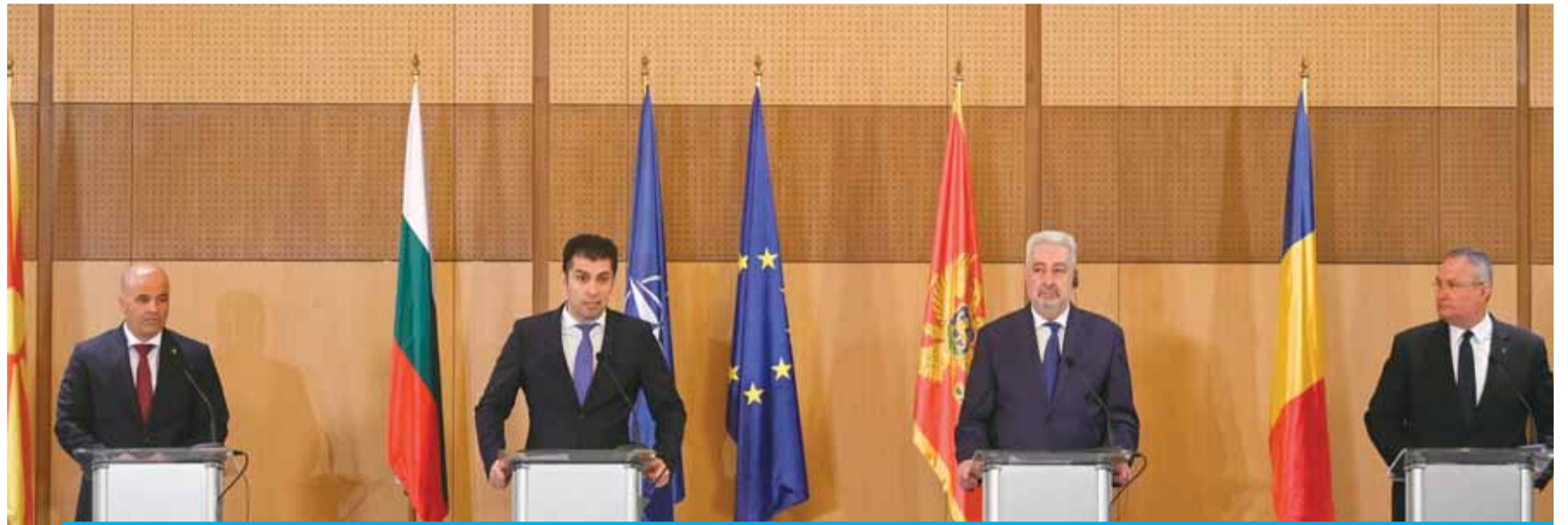
SOFIA, Bulgaria: (From L) North Macedonia's Prime Minister Dimitar Kovacevski, Bulgarian Prime Minister Kiril Petkov, Montenegro's Prime Minister Zdravko Krivokapic and Romanian Prime Minister Nicolae Ciuca take part in a conference after a meeting of the heads of state of NATO countries from Southeast Europe, in Sofia, on March 28, 2022.

The UN estimates that at least 1,100 civilians have died and more than 10 million have been displaced in a devastating war that has gone on far longer than Moscow leaders expected. The new talks-starting in Turkey on either Monday or Tuesday, according to conflicting reports-come