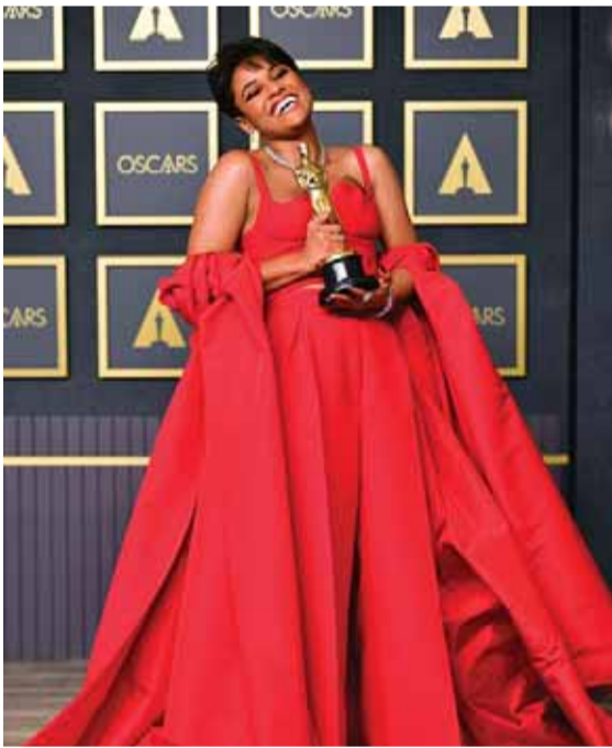
Actress Ariana DeBose poses with her Oscar for Best Supporting Actress for 'West Side Story' in the press room.

"CODA," a feel-good indie drama about a deaf family defying the odds, pulled off a stunning upset to scoop the top prize at the Oscars Sunday, becoming the first-ever streaming film to win best picture.