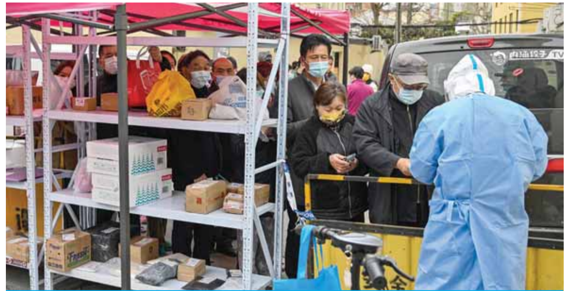
SHANGHAI, China: Residents are being checked at the entrance of a residential area that is in lockdown, in Jing'an district in Shanghai on March 28, 2022.

China has reported several thousand new daily