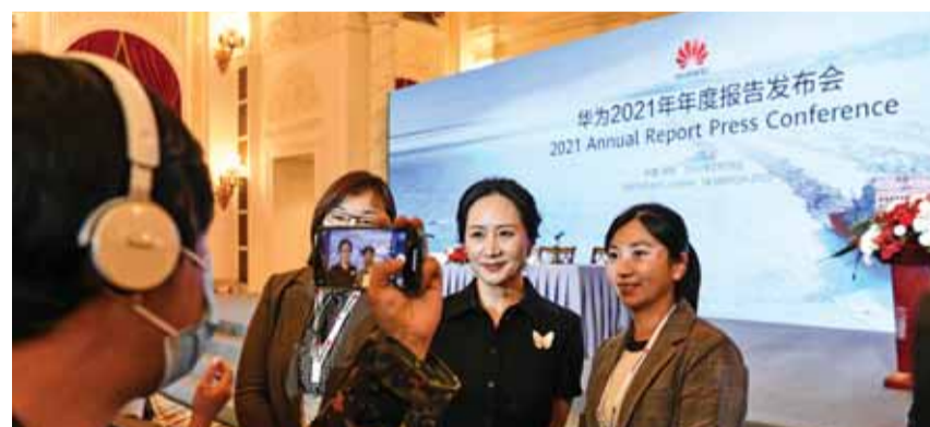
SHENZHEN: Huawei chief financial officer Meng Wanzhou poses for photos after the Huawei 2021 Annual Report Press Conference in Shenzhen, in China's southern Guangdong province on March 28, 2022.