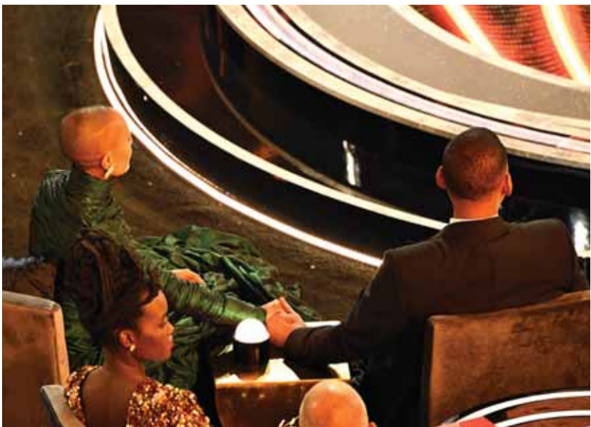
US actor Will Smith (right) sits alongside US actress Jada Pinkett Smith with the award for Best Actor in a Leading Role for "King Richard".