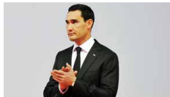
ASHGABAT: File photo shows Serdar Berdimukhamedov, the 39-year-old son of the country's leader seen during a ceremony in the capital Ashgabat. The son of Turkmenistan's autocrat leader Gurbanguly Berdimukhamedov has won a decisive victory in presidential elections.

His opponents, by contrast, were mostly little-known state employees in an all but invisible pre-election campaign. Bursting into public view as a lawmaker several years ago, Serdar Berdimukhamedov is also head of associations promoting the alabai shepherd dog and the Akhal-Teke horse-two national breeds that are important symbols of state propaganda. He promised that Turkmenistan "will preserve and increase" the two breeds in his inaugural speech. Gurbanguly Berdimukhamedov is set to remain in politics as head of the upper house, a position which makes him the second-highest ranking official in the state.