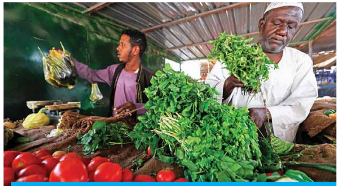
KHARTOUM, Sudan: Vegetable vendors sell fresh produce at a market in the Sudanese capital Khartoum.

"The absence of international aid and loans in the 2022 budget is having a negative effect," he said, pointing out that the fiscal plans rely heavily on tax rises. "Taxes now constitute 58 percent of the budget, sharply increasing prices and pushing the country into recession." Sudan has been reeling from triple-digit