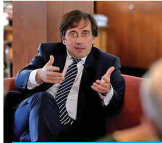
Spanish Foreign Minister Jose Manuel Albares.