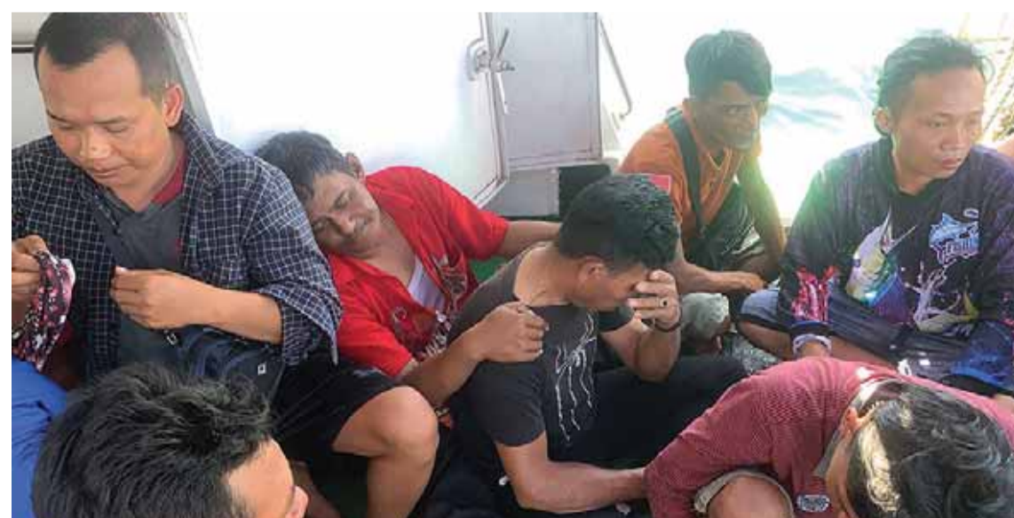
AT SEA, Indonesia: This handout photo from Search and Rescue (SAR) team and taken on March 19, 2022 and released yesterday shows migrant workers sitting on a boat during a rescue operation at sea in North Sumatra water. — AFP

dents are common due to bad weather and poor safety measures. In January six Indonesian women drowned off the coast of Malaysia after their boat capsized during a suspected attempt to enter the country illegally. A month earlier, 21 Indonesian migrants also died after their boat capsized. — AFP