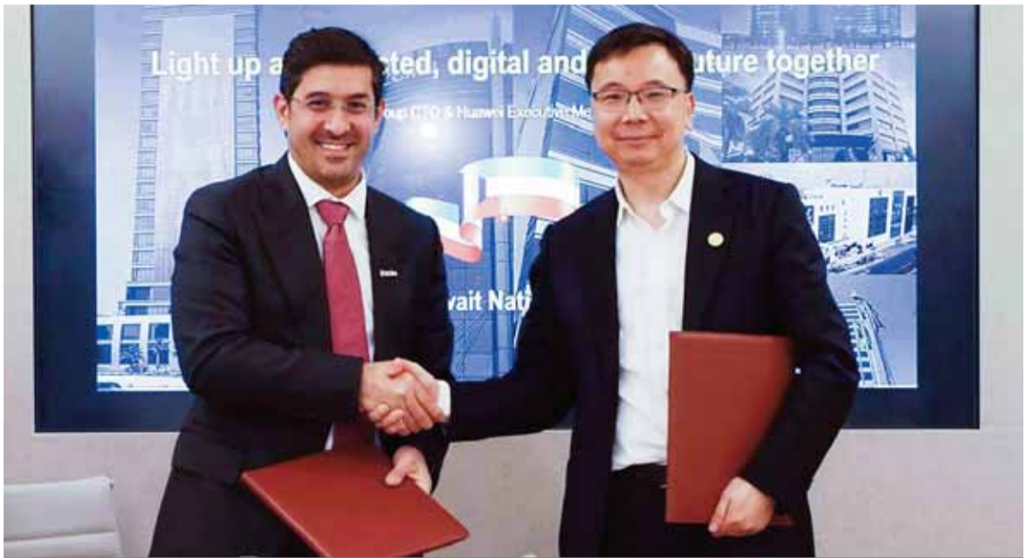
BARCELONA: After signing the memorandum of understanding.

Zain aims to empower marginalized and disadvantaged communities by providing digital transformation solutions to create social and financial value. This will be achieved by ensuring inclusive access to connectivity, IoT, digitalization of Zain's core products and services, and the development of digital verticals. In addition, Zain will work closely with Huawei to develop the application of new 5G services and intelligent networks to accelerate the digital transformation of the societies it serves.