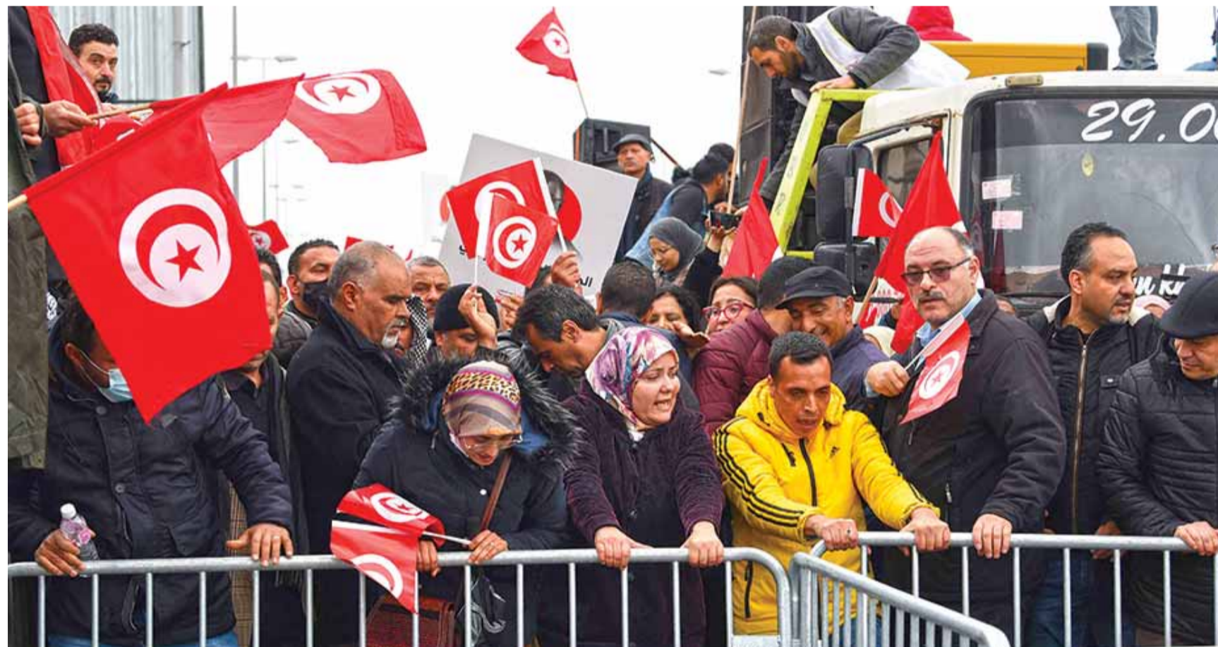
TUNIS: Tunisian protesters try to remove metallic barriers installed by security forces, during a demonstration against their president, not far from the Tunisian Assembly (parliament) headquarters, in the capital Tunis, yesterday. — AFP

"Our community will never be broken and we refuse to be intimidated," he tweeted. In June in Ontario, a man driving a pick-up truck deliberately ran over a Canadian family of Pakistani origin, killing four people. Police said it was a case of Islamophobia. — AFP