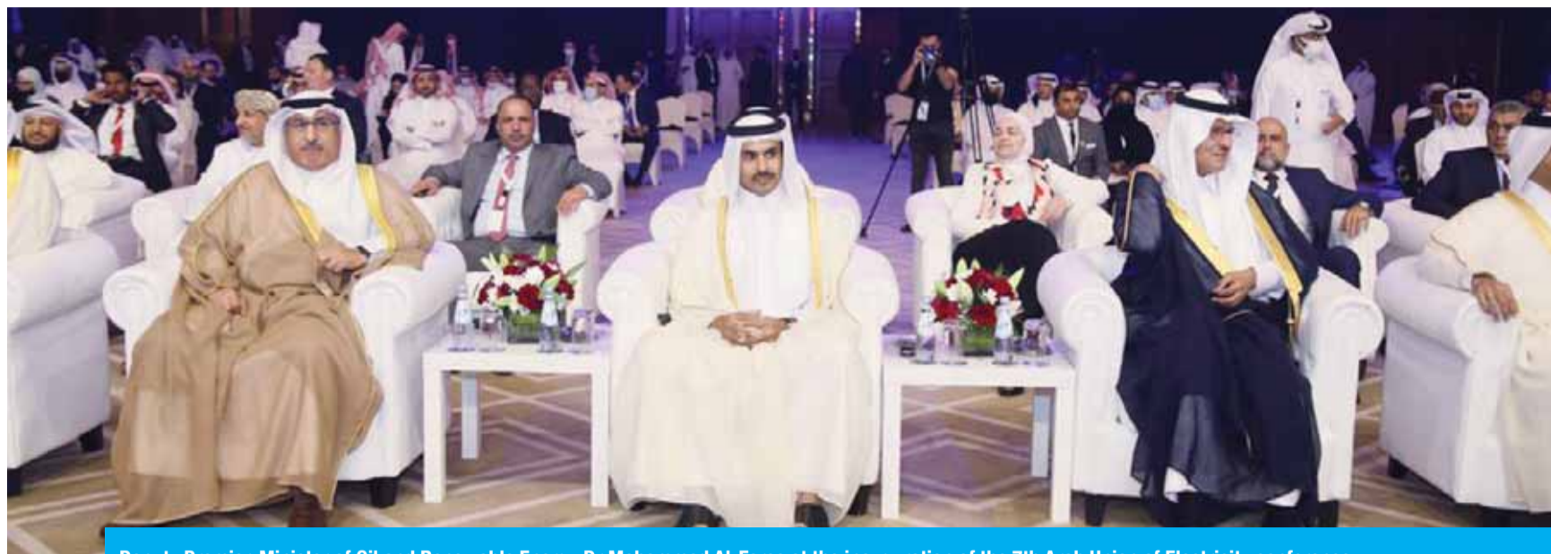
Deputy Premier, Minister of Oil and Renewable Energy Dr Mohammad Al-Fares at the inauguration of the 7th Arab Union of Electricity conference.

Meanwhile, Qatari Amir Sheikh Tamim bin Hamad Al-Thani yesterday discussed a number of plans for overhauling the energy and power