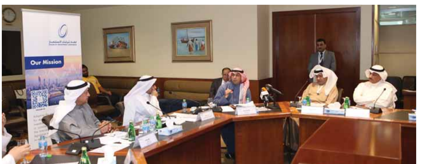
The fifth Kuwait Investment Forum in progress.