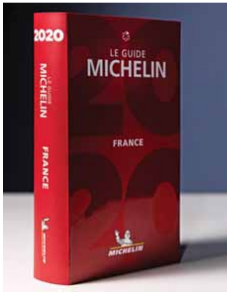
This file photo shows the 2020's Michelin Red Guide, the oldest European hotels and restaurants reference guide.

F rance's prestigious Michelin Guide is among the world's most influential references on gourmet dining, its star ratings highly coveted and sometimes controversial. Ahead of the publication of its 2022 edition on Tuesday, here is some background.