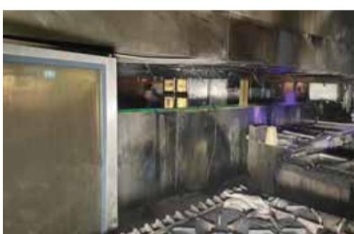
KUWAIT: Firefighters put out a limited fire that broke out in a restaurant in the Ardiya Industrial Area yesterday. The quick response from the firefighters prevented the fire from spreading to the rest of the place.