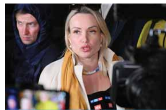
MOSCOW: File photo shows Marina Ovsyannikova, the editor at the state broadcaster Channel One who protested against Russian military action in Ukraine during the evening news broadcast at the station late Monday.

"As soon as the war began, I could not sleep, I could not eat. I came to work, and after a week of coverage of this situation, the atmosphere on