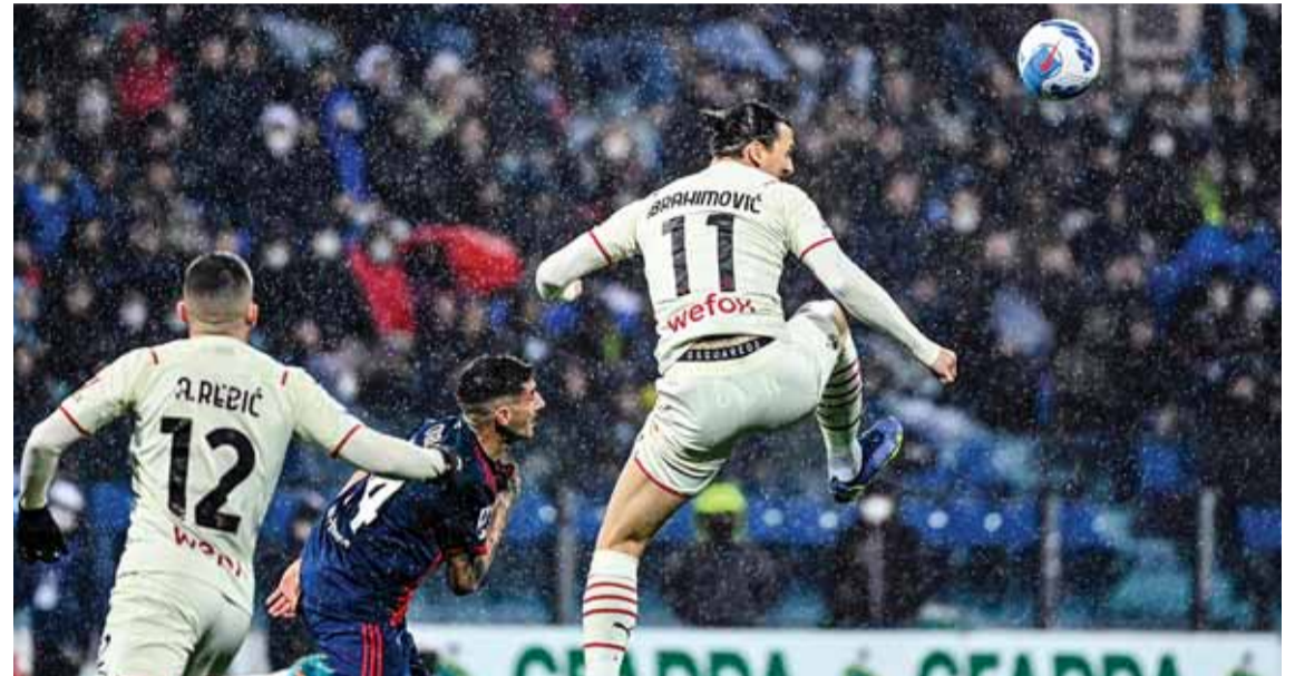
CAGLIARI: AC Milan's Swedish forward Zlatan Ibrahimovic goes for the ball during the Italian Serie A football match between Cagliari and AC Milan, on March 19, 2022.

They were saved by VAR 10 minutes after Dumfries' leveller, when referee Daniele Chiffi over-ruled his own decision to give Inter a penalty for a foul by Lorenzo Venuti on Lautaro Martinez after an on-field review. Osimhen was the hero of the hour for