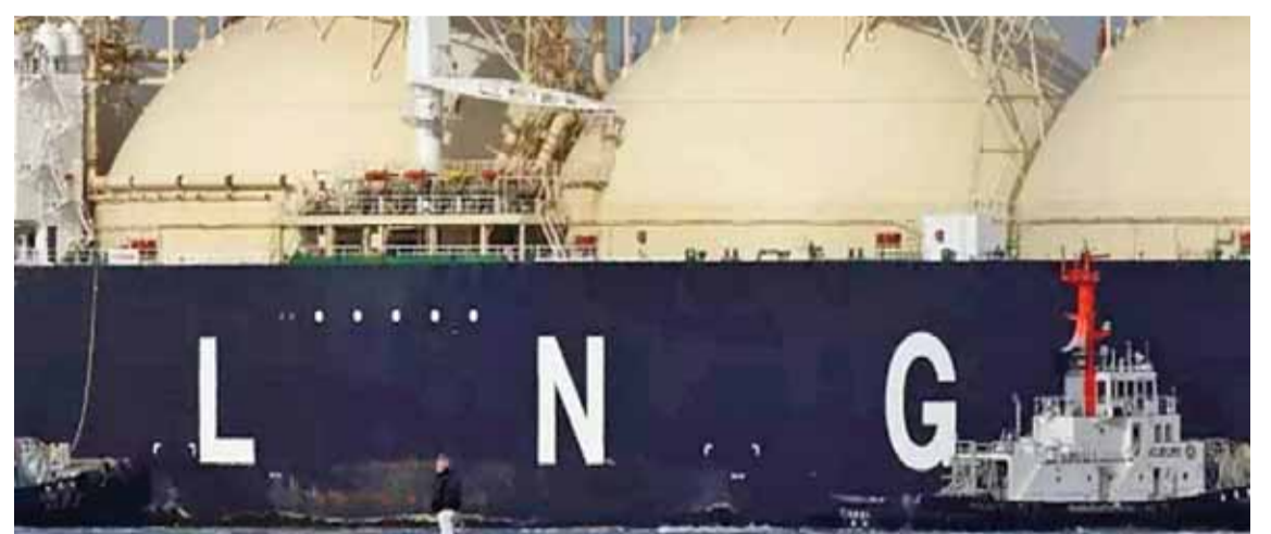
LNG projects have been boosted by the renewed emphasis on energy independence after Russia's invasion of Ukraine.

He added that, in his estimation, the government's regulatory approvals for both Calcasieu and another project near New Orleans have been "faster than they were before" the war in Ukraine. "They're being very supportive, so I'm very optimistic that they're going to approve projects more quickly," he said. In a room reserved for him at the CERAWEEK convention, Sabel shows a few journalists a video of tugboats, which he said were named after his children, maneuvering near the new plant. He notes another reason for the sector to celebrate: In early February, the European Commission ruled that gas could, under certain conditions, contribute to the fight against climate change. — AFP