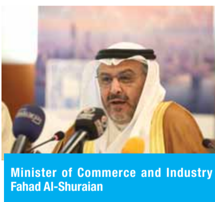
Minister of Commerce and Industry Fahad Al-Shuraian