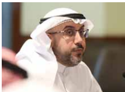
MP Osama Al-Shaheen