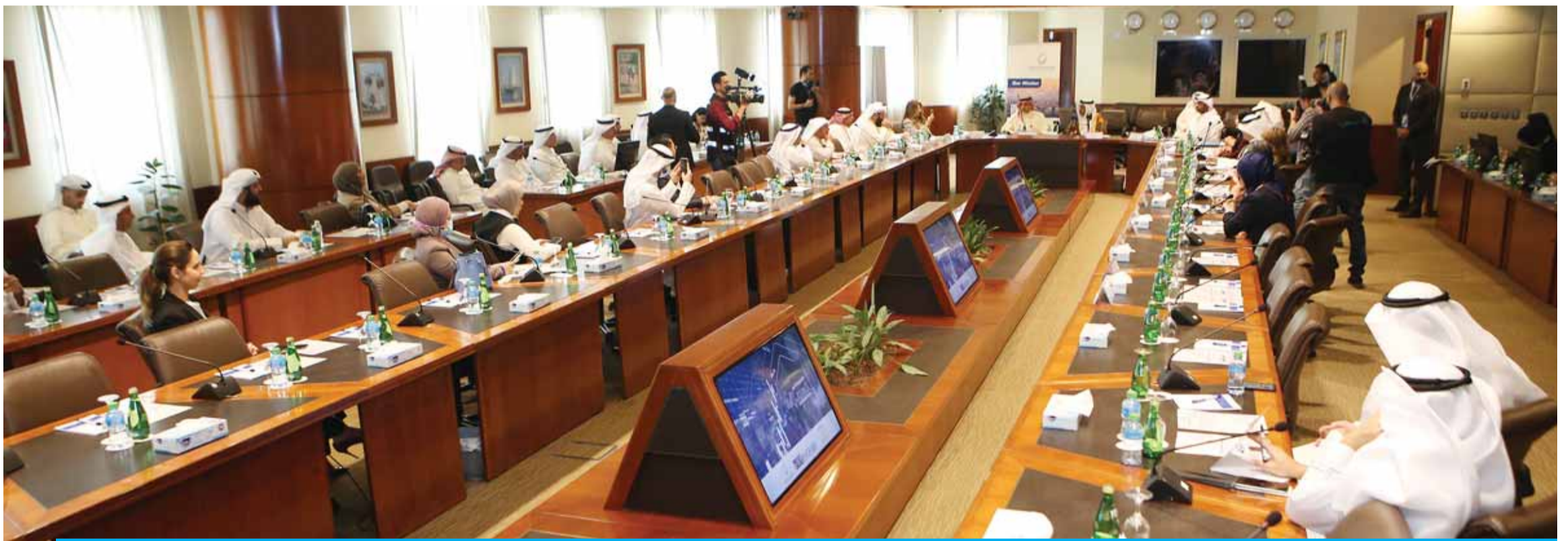
KUWAIT: A general view of the fifth Kuwait Investment Forum titled: 'Investing in Kuwait, missed and available opportunities' at the Chamber of Commerce yesterday.

Union of Investment Companies (UIC) organizes fifth Kuwait Investment Forum