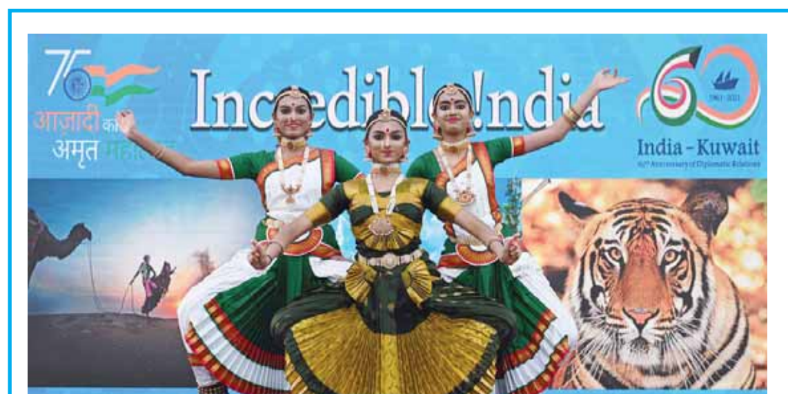
KUWAIT: Incredible India at the Diplomatic Festival at Abraj Park Adaliya on March 19, 2022. The event featured Indian dance, music and cuisine.