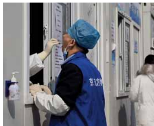
BEIJING: A health worker takes a swab sample from a woman to be tested for COVID-19 at a swab collection site yesterday.