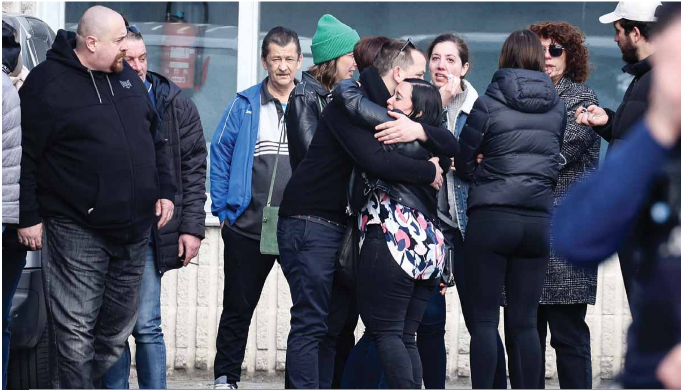
STREPY-BRACQUEGNIES, Belgium: People gather near a gymnasium where witnesses and relatives of victims are received near the site where a car crashed into a crowd of early morning carnival-goers killing six people and injuring 12 others seriously in Strep-Bracquegnies.