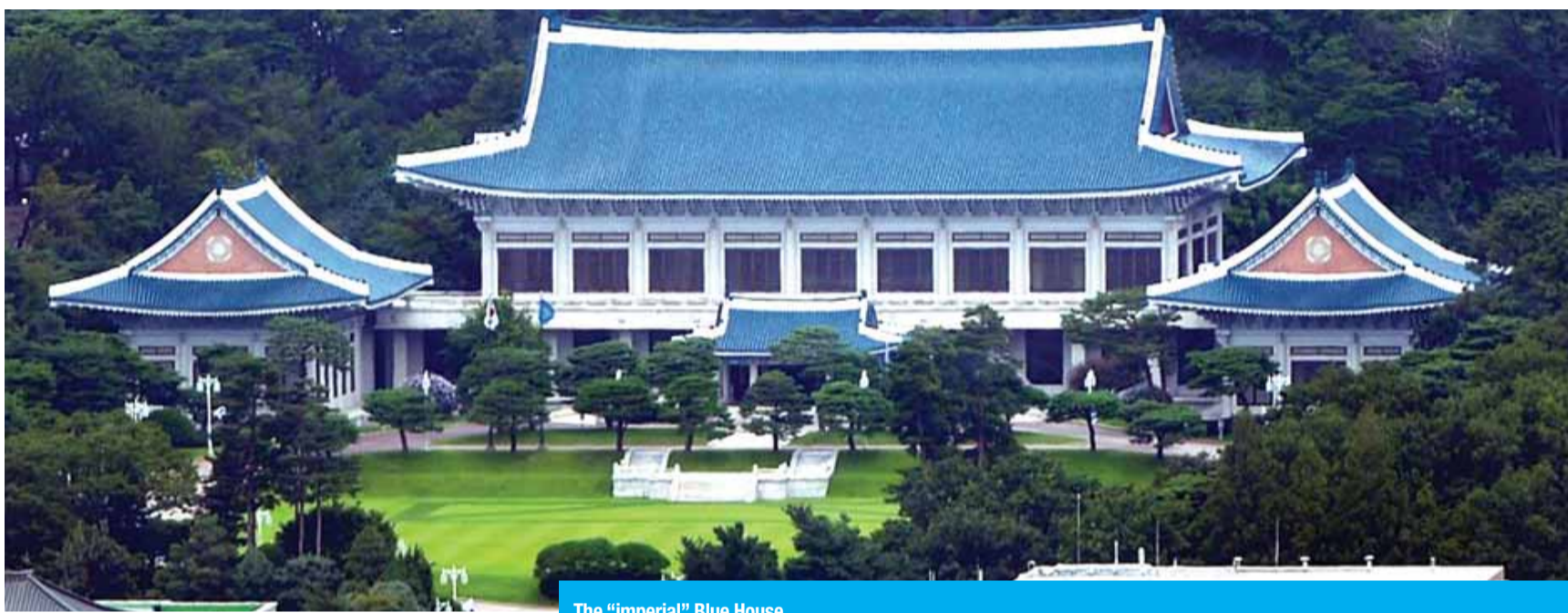
The "imperial" Blue House.

The Blue House will be fully open to the public starting May 10, he added. Perched in the mountains of northern Seoul and named for its azure roof, the grounds around the Blue House were home to royalty as well as the colonial governor-general during Japan's annexation of Korea. It then became home to South Korea's president in 1948. — AFP