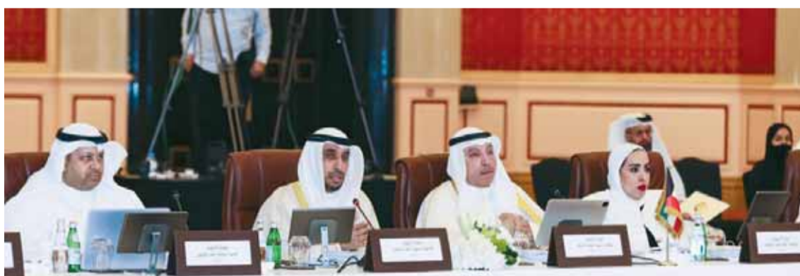
Kuwaiti Audit Bureau delegation, headed by Faisal Al-Shaya