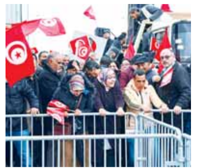
Tunisians protest against Saied, poll on reforms

Appeal launched over Pakistani brother's killing of social media star Page 7