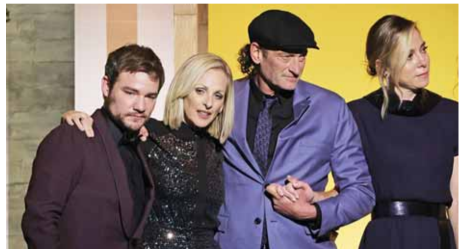
(From left) Daniel Durant, Marlee Matlin, Troy Kotsur and Sian Heder accept the Darryl F Zanuck Award for Outstanding Producer of Theatrical Motion Pictures for 'CODA' onstage during the 33rd Annual Producers Guild Awards at Fairmont Century Plaza.

The Academy Awards take place in Hollywood on March 27. "In music, coda means the end of a movement. But our film is the beginning of one," said "CODA" actress Marlee Matlin. "It's a wonderful thing that audiences have embraced our movie and it's wonderful to be making