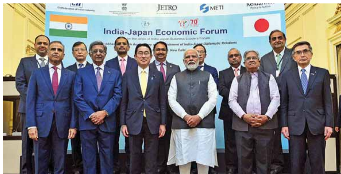
NEW DELHI: Japan's Prime Minister Fumio Kishida (front third left) and his Indian counterpart Narendra Modi (front third right) pose for a group photo during the India-Japan Economic Forum at the Hyderabad House in New Delhi on Saturday.