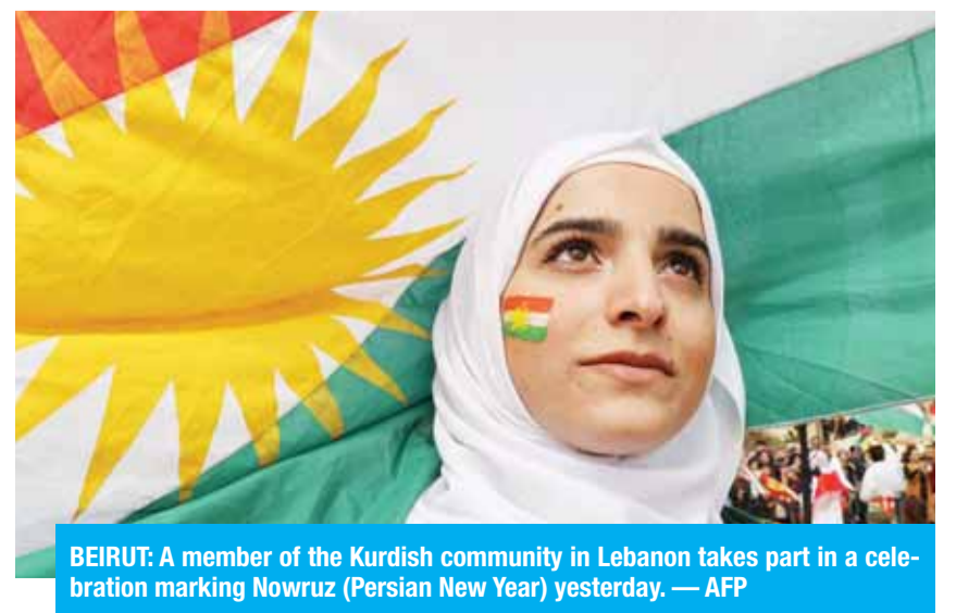
BEIRUT: A member of the Kurdish community in Lebanon takes part in a celebration marking Nowruz (Persian New Year) yesterday.