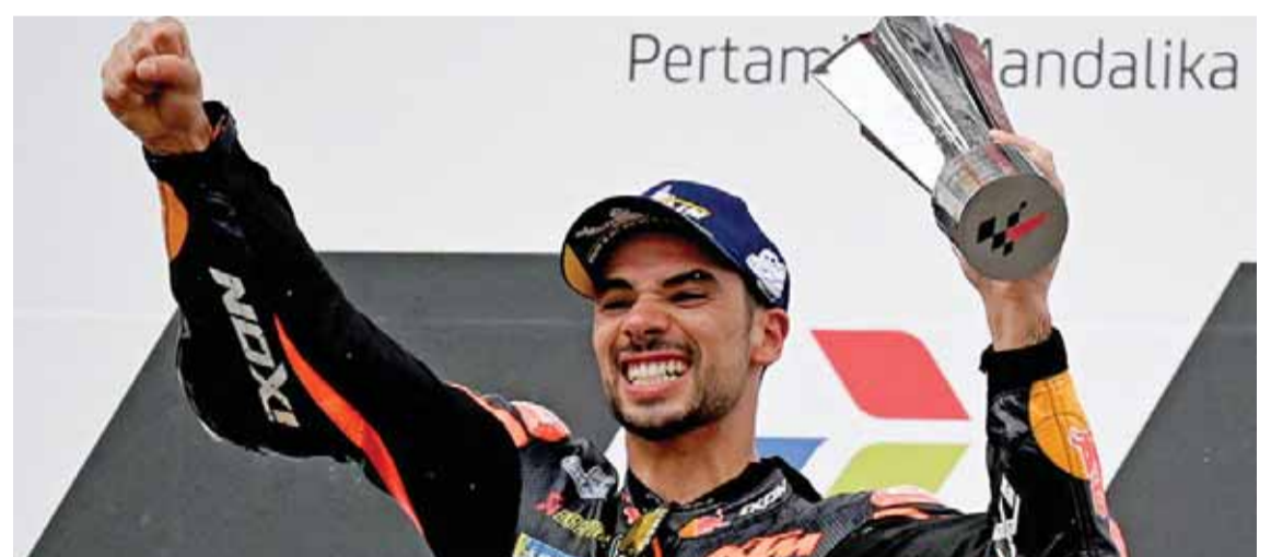
KUTA MANDALIKA: First-placed Red Bull KTM Factory Racing's Portuguese rider Miguel Oliveira celebrates after winning the Indonesian Grand Prix MotoGP race yesterday.

Zarco was a little disappointed that he was unable to push hard early in the race and by the time he figured out the track and grip it was too late to finish any higher than third. "It's a podium in MotoGP which is always nice, but really I needed a little bit of time," he said. "So I lost too much time at least for the second place, but when the track was clear, I could be very fast. So third place, I take it." Six-time world champion Marc Marquez was earlier ruled out with concussion after a horror morning warm-up crash that catapulted him into the air on turn seven.—AFP