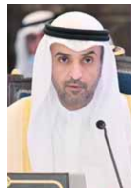
Dr Nayef Al-Hajraf

Such continuous terrorist acts on civil and economic installations in several regions in the kingdom target not only security of the kingdom and the region, but also aims at disrupting supplies to the international energy markets, undermining the global economy and navigation, the Kuwaiti Foreign Ministry said in a statement. It called for rapid reaction from the international community to deter such criminal and terrorist attacks and bring the culprits to account. —KUNA