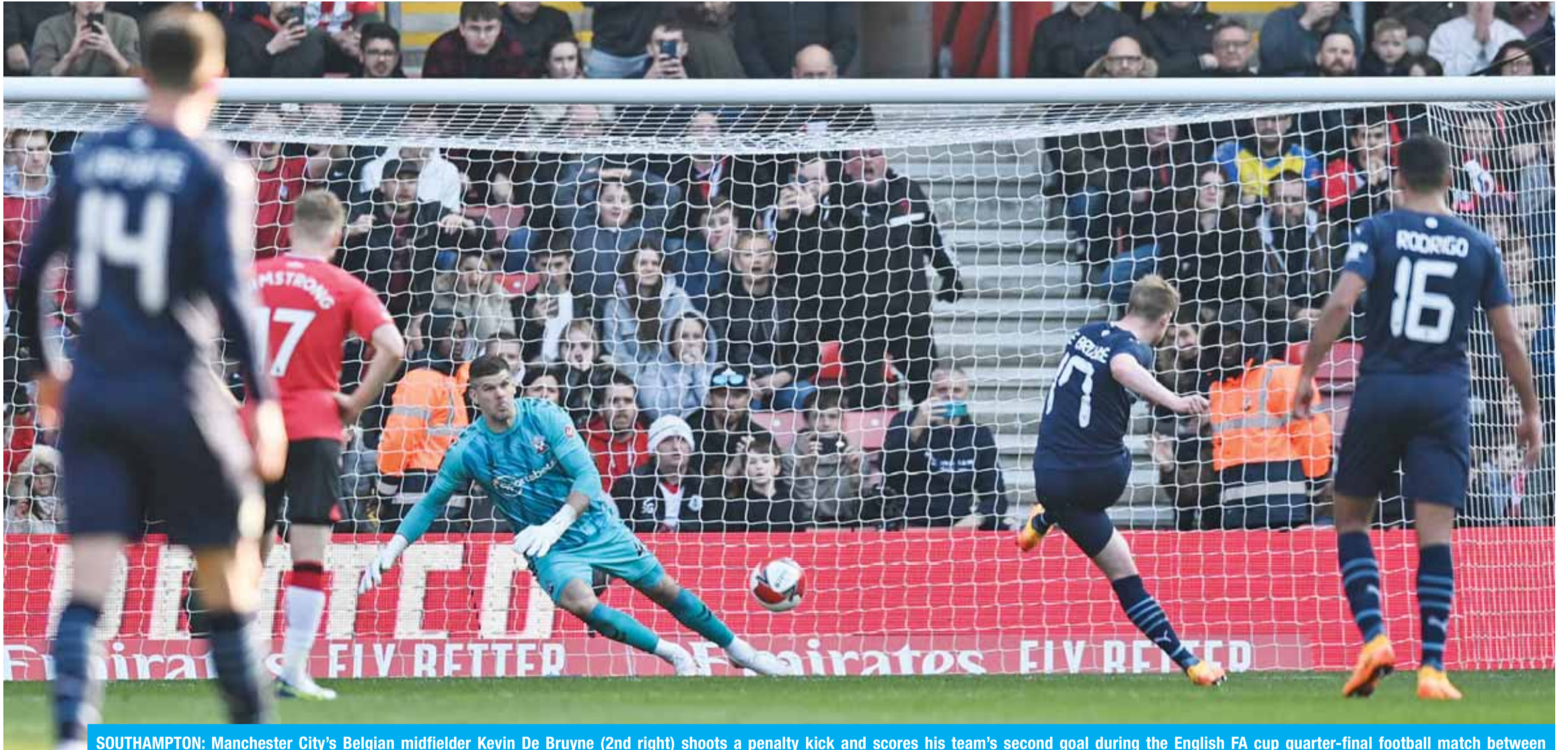
SOUTHAMPTON: Manchester City's Belgian midfielder Kevin De Bruyne (2nd right) shoots a penalty kick and scores his team's second goal during the English FA cup quarter-final football match between Southampton and Manchester City yesterday.