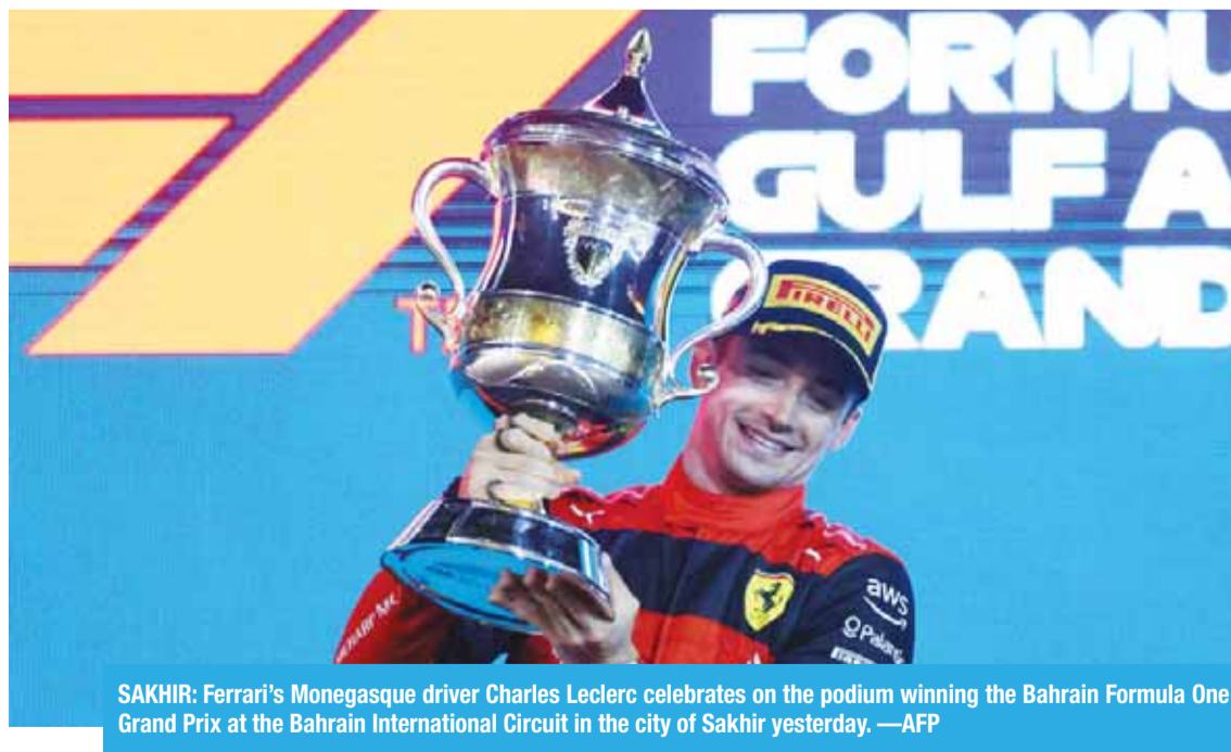
SAKHIR: Ferrari's Monegasque driver Charles Leclerc celebrates on the podium winning the Bahrain Formula One Grand Prix at the Bahrain International Circuit in the city of Sakhir yesterday.

Once the race trophy was in his hands, Leclerc said: "I'm so happy. We knew this was a big opportunity for the team and the guys have done an incredible job building into amazing car. "A one-two today with Carlos - we couldn't hope for better. It's incredible to be back at the top." Leclerc had started on pole and in a furious early part of the race, he exchanged the lead with Verstappen