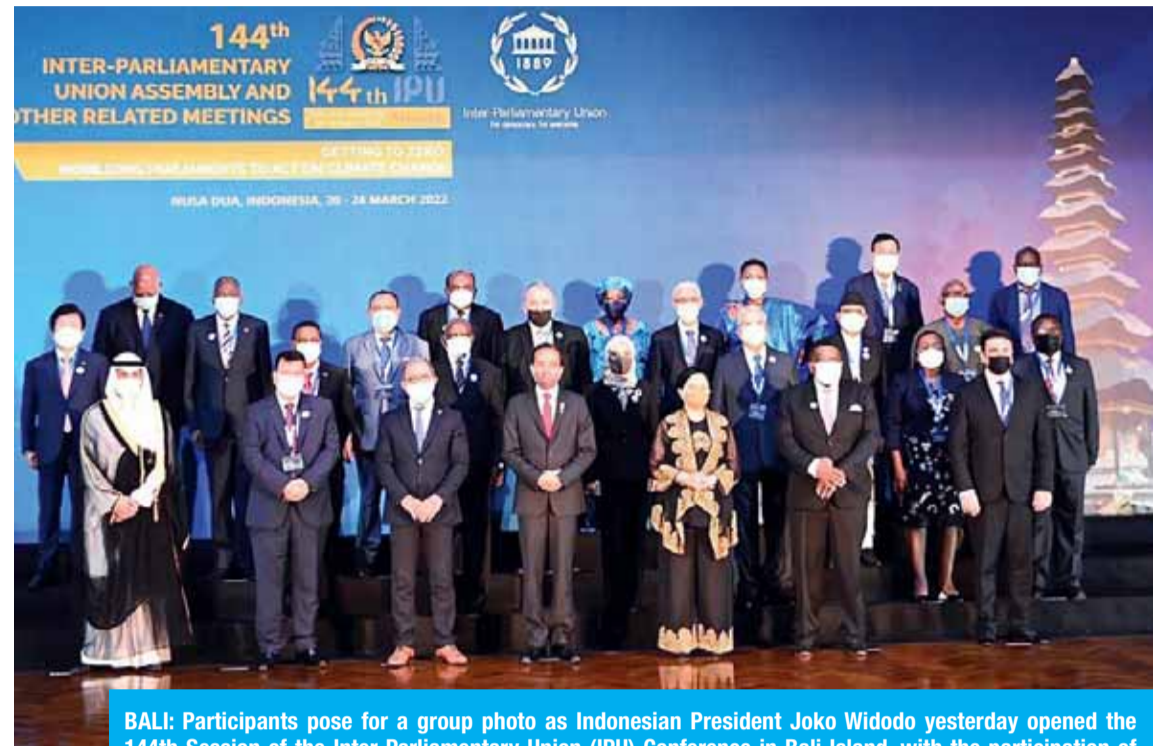
BALI: Participants pose for a group photo as Indonesian President Joko Widodo yesterday opened the 144th Session of the Inter-Parliamentary Union (IPU) Conference in Bali Island, with the participation of Kuwaiti National Assembly Speaker Marzouq Ali Al-Ghanem and his accompanying delegation.