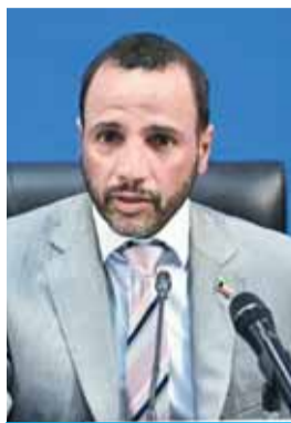
Marzouq Ali Al-Ghanem

The Syrian government, for its part, is desperate to revive economic ties with wealthy Arab states after years of war and US sanctions. At least 90 per cent of Syrians live in poverty and more than half have been displaced by war. — AFP