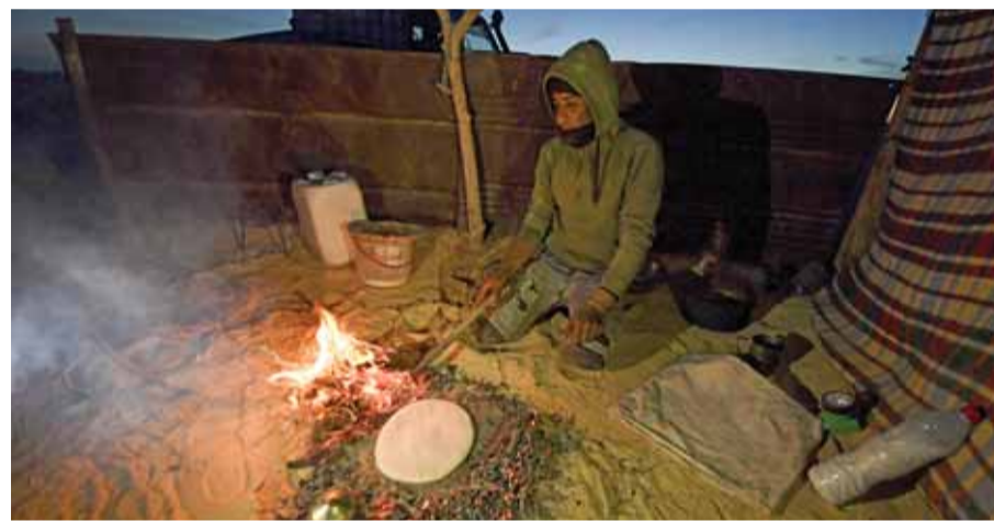
A camel herder prepares bread for his dinner in the Tunisian desert in Ong Jemel (Camel's Neck), near the Chott (salt lake) of Chihatt Sghat, north of Tunisia's southwestern Nefta oasis.