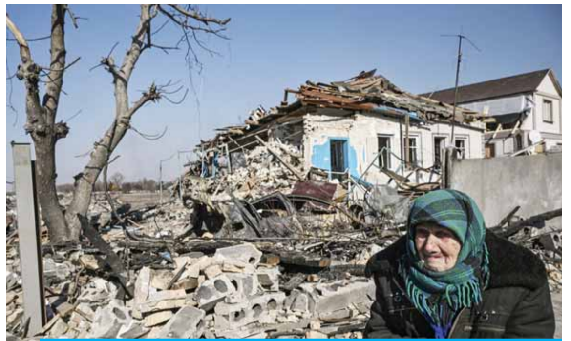
KRASYLIVKA, Ukraine: An elderly woman stands in front of a destroyed house after bombardments in this village east of Kyiv yesterday as Russian forces try to encircle the Ukrainian capital.