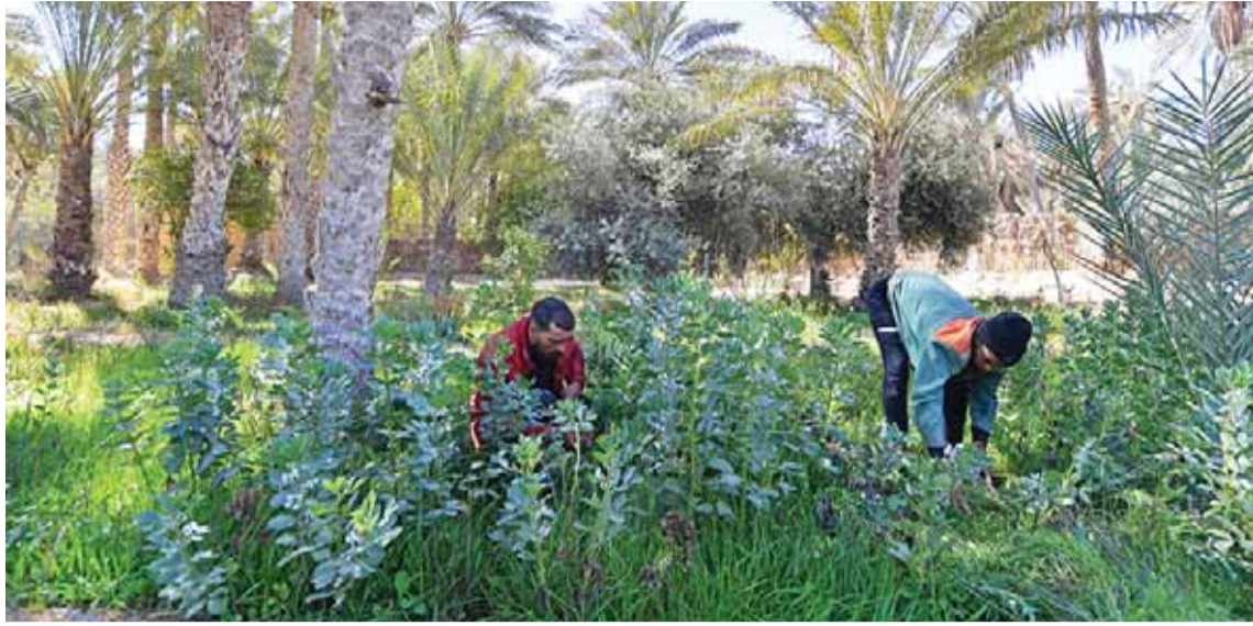
Employees cultivate the Dar Hi hotel's vegetable garden amidst palm trees in the remote Nefta oasis, a seven-hour drive from the coastal Tunisian capital Tunis.