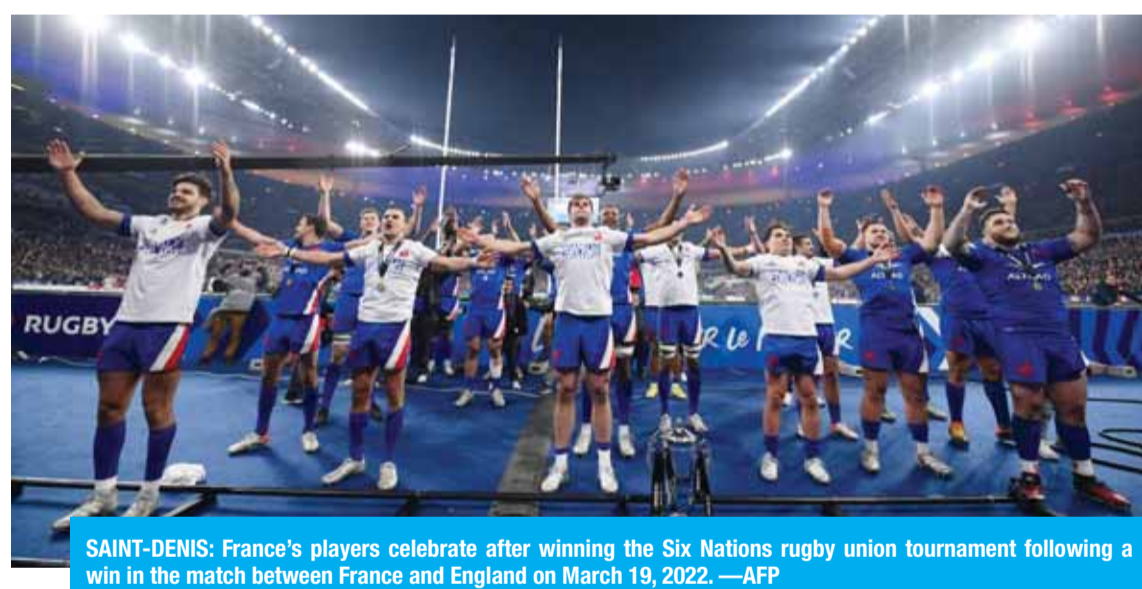
SAINT-DENIS: France's players celebrate after winning the Six Nations rugby union tournament following a win in the match between France and England on March 19, 2022.

All great teams are built on defense and English coach Shaun Edwards has instilled a discipline in that