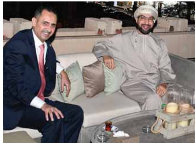
Omani and Jordanian Ambassadors.