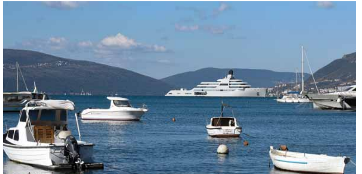
TIVAT: Superyacht Solaris, owned by the Russian oligarch Roman Abramovich, which is under UK sanctions, sails towards the luxury yacht marina Porto Montenegro. The owner of the London football club 'Chelsea' is among the Russian oligarchs against whom Great Britain imposed sanctions as part of the response to the Russian invasion of Ukraine.