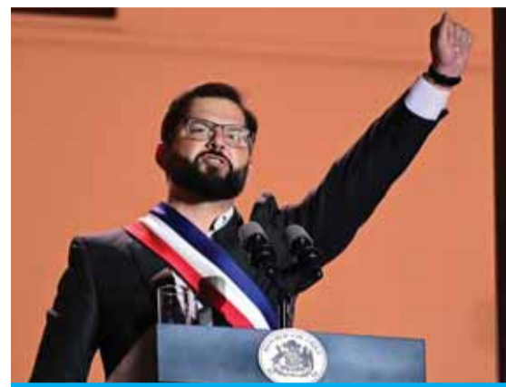
SANTIAGO: Chile's new President Gabriel Boric delivers a speech at La Moneda Palace on Friday.

trip to Valparaiso from Coronel, hundreds of kilometers away. A lawmaker since 2014, millennial Boric inherits an economy ravaged by the coronavirus pandemic. Much of 2021's GDP growth was fueled by temporary pandemic grants and stop-gap withdrawals allowed from private pension funds. The central bank has been hiking interest rates to curb inflation. Pineru finishes his term with a disapproval rating of 71 percent, the worst recorded by a president since the return of democracy in 1990. Boric has promised to introduce a European-style social democracy to Chile, boosting taxes to pay for social reform, all while putting the brakes on spiraling debt. —AFP