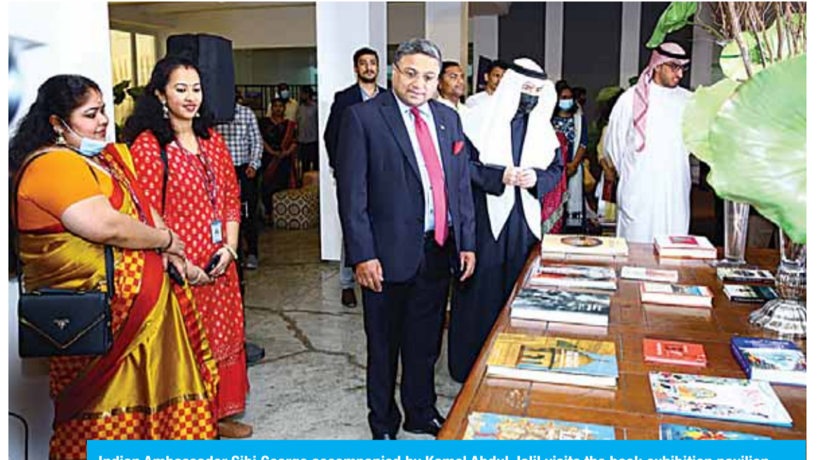
Indian Ambassador Sibi George accompanied by Kamel Abdul Jalil visits the book exhibition pavilion.

The ambassador dedicated yesterday 'Splendors of India' festival to more than fifty