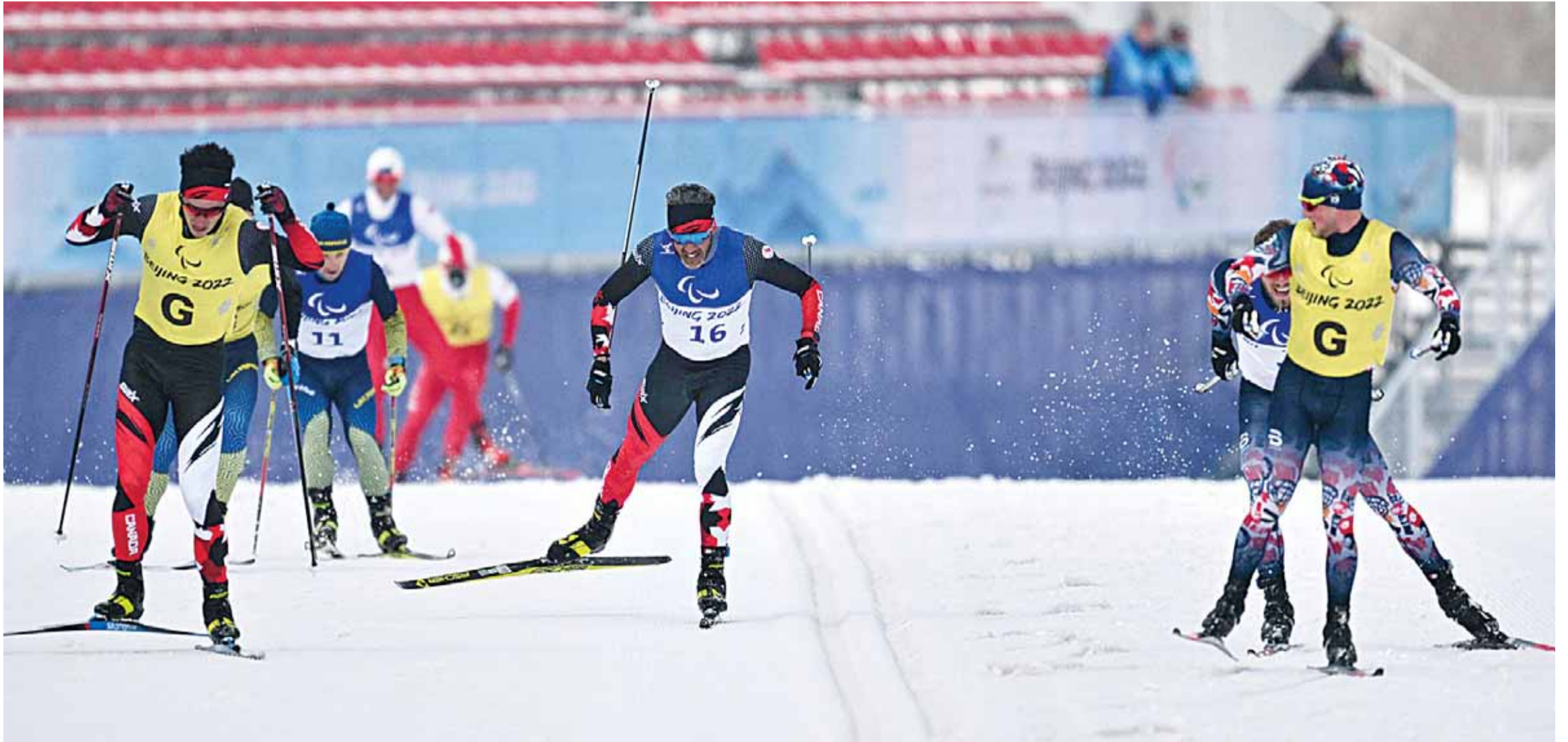
ZHANGJIAKOU: Canada's Brian McKeever (center) races towards the finish line during the men's middle distance free technique vision impaired para cross-country skiing event yesterday at the Zhangjiakou National Biathlon Centre.