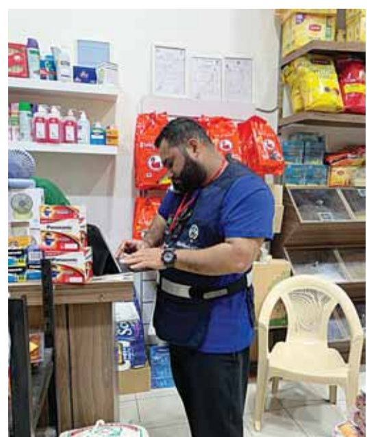
KUWAIT: Commerce and Industry ministry inspectors issued 10 citations during an inspection tour of stores around Kuwait. Nine stores were cited for not placing price tags on products, while one was cited for artificial price hiking.