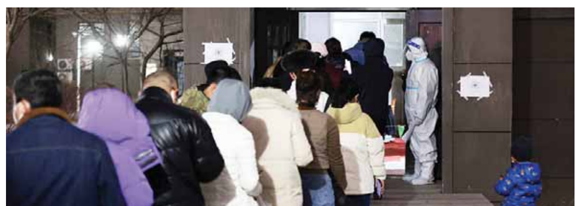
CHANGCHUN, China: Residents queue to undergo nucleic acid tests for COVID-19 on Friday.

Shanghai on Friday ordered its schools to close and