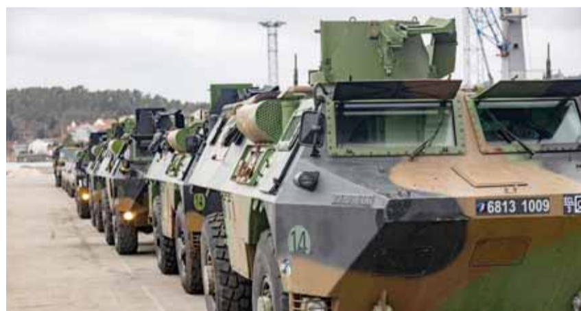
FREDRIKSTAD, Norway: Armored vehicles of NATO's rapid reaction force brigade in Norway for the military exercise Cold Response 22 arrive at Borg Havn on March 10, 2022.

"I find it totally normal, perhaps now more than ever, to train together to demonstrate our capacity and our willingness to defend our values and our way of life", stressed General