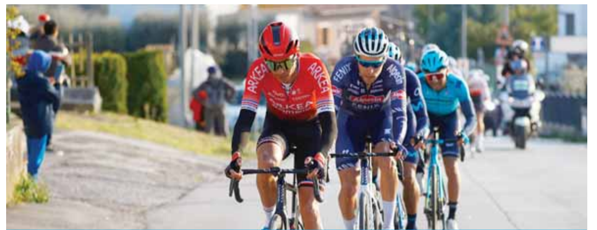
FERMO: Team Arkea - Samsic's Warren Barguil of France (front left) rides with the leading group in the last kilometers of the 5th stage of the Tirreno Adriatico cycling race, 155 km from Sefro to Fermo yesterday.

of wickets late in the innings but by then the damage had been done. They made a promising start to the run chase, racing to 81 without loss after 10 overs. But after openers Deandra Dottin and Hayley Matthews were dismissed for 62 and 43, India managed to take wickets regularly and reduced the West Indies to 6-140 after 25 overs.