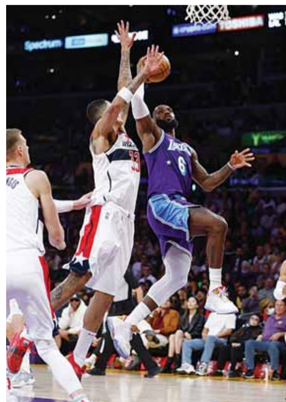
LOS ANGELES: LeBron James #6 of the Los Angeles Lakers takes a shot against Kyle Kuzma #33 of the Washington Wizards in the third quarter at Crypto.com Arena on March 11, 2022.

Boston's Jayson Tatum had 31 points, eight rebounds and six assists to spark the Celtics over visiting Detroit 114-103. Jaylen Brown returned