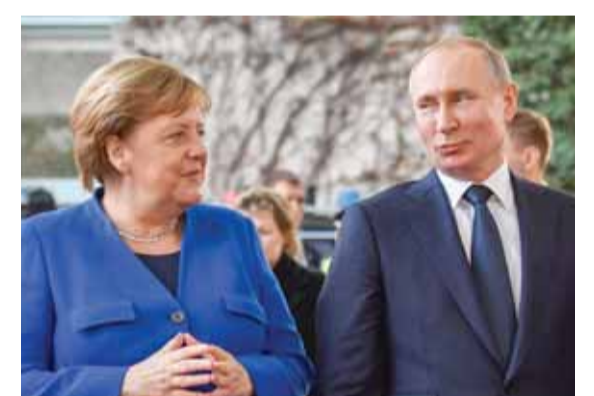
BERLIN: In this file photo taken on Jan 19, 2020, German Chancellor Angela Merkel greets Russian President Vladimir Putin upon his arrival to attend the Peace summit on Libya at the Chancellery.