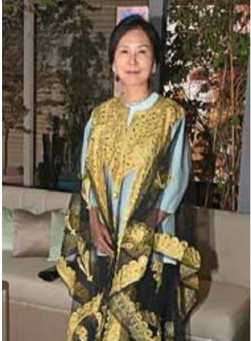
Korean Ambassador's wife.