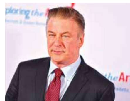
In this file photo actor Alec Baldwin attends the 'Exploring the Arts' 20th anniversary Gala at Hammerstein Ballroom in New York City.