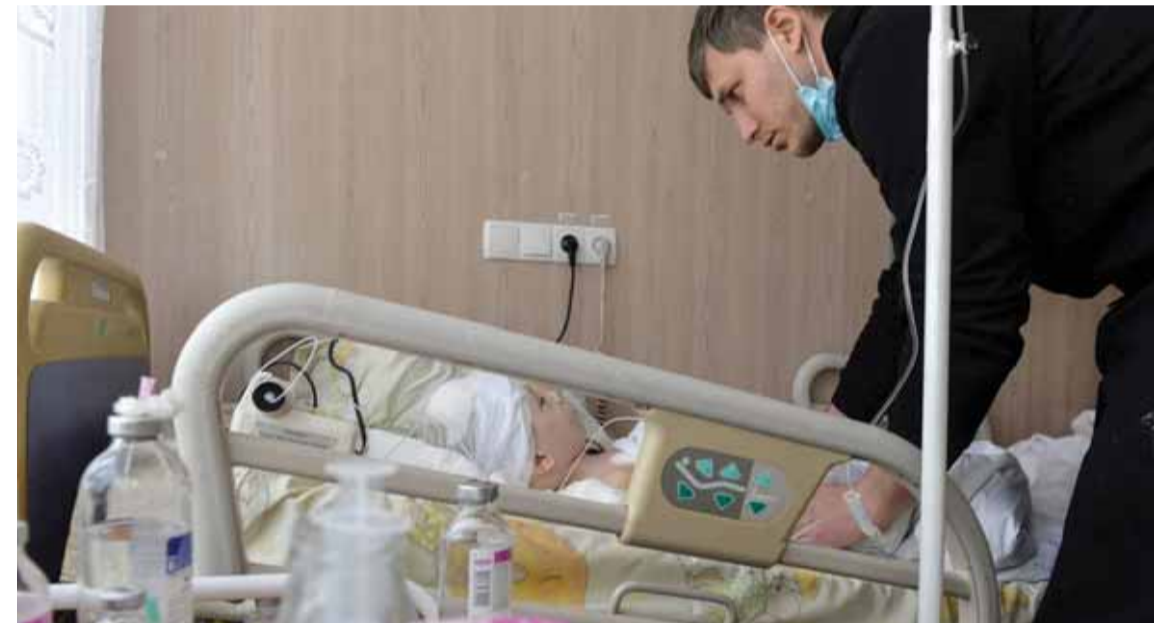
KHARKIV: A father takes care of his 7-year-old son who was injured by the shelling in a hospital in Ukraine's second-biggest city on March 10, 2022.

And many soldiers flocked in to buy flowers for