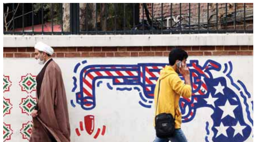
TEHRAN: Iranians walk past an anti-US mural on a wall of the former United States embassy yesterday.