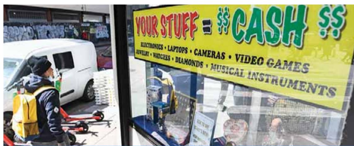
LOS ANGELES: A pedestrian walks past signage offering cash for valuables outside of a pawn shop in downtown Los Angeles, California.

Putin's ruling United Russia party told the Kremlin chief that it had prepared a draft bill that would be "the first step towards the nationalization of assets of foreign companies leaving the Russian market." It said the bill aims to "save jobs." Potanin, 61, regularly features at the top of Forbes list of Russia's richest people. He is close to Putin, with whom he has been seen playing hockey. Other Russian oligarchs have criticized Russia's economic policies since Putin sent in troops to Ukraine—stopping short at criticizing the president himself. —AFP