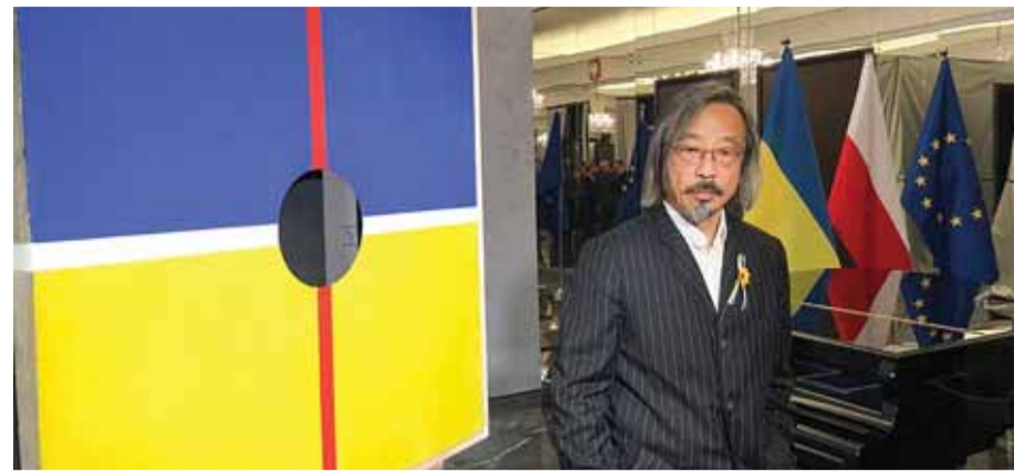
This photo shows Chinese artist Huang Rui posing with his artwork "Absence of Black Moon" during a "Together for Peace" event at the Poland embassy in Beijing.

China has repeatedly blamed NATO's "eastward expansion" for worsening tensions between Russia and Ukraine, echoing the Kremlin's prime security grievance, while refusing to criticise Moscow's decision to send troops across the border. President Xi Jinping urged "maximum restraint" to avoid a "humanitarian crisis" during a Tuesday video summit with France's Emmanuel Macron and Germany's Olaf Scholz. —AFP