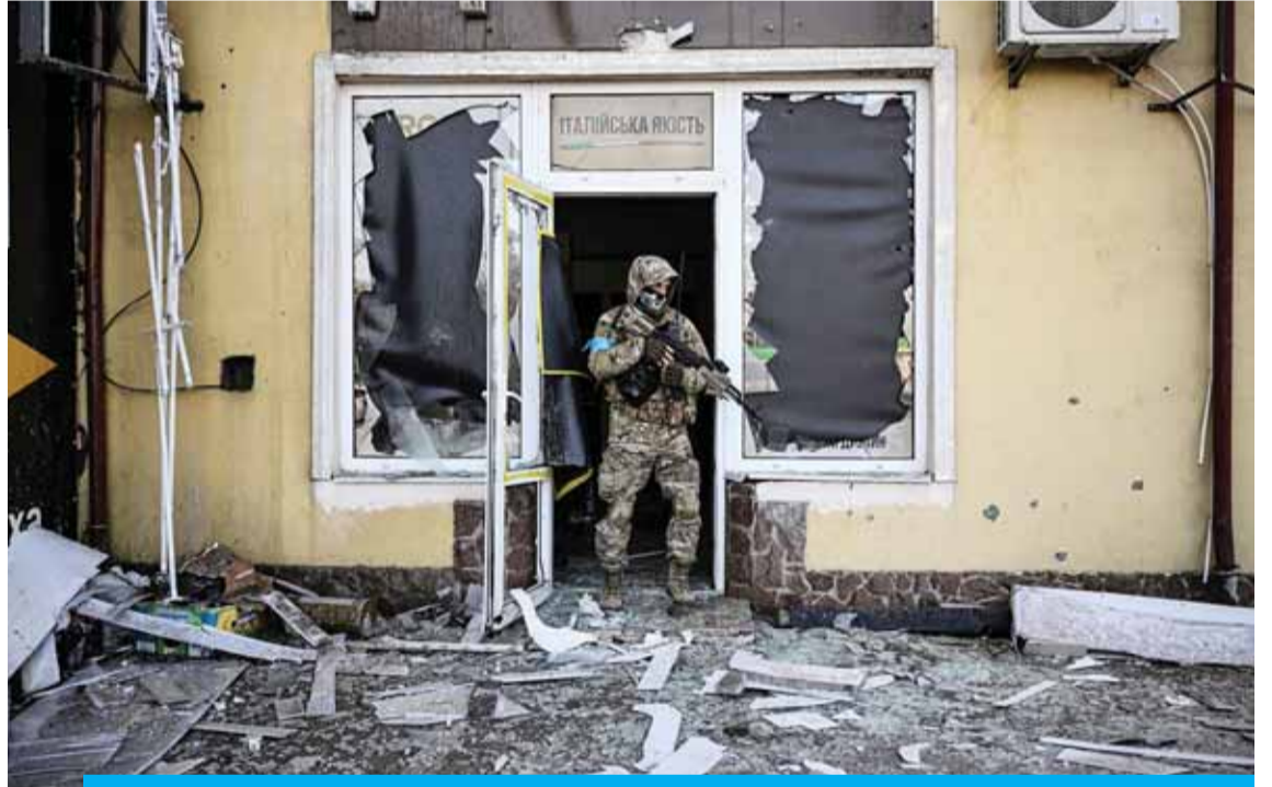
KYIV: A Ukrainian serviceman exits a damaged building after shelling in the capital yesterday.