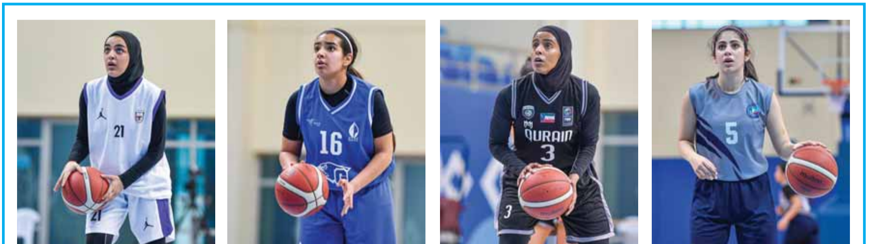
KUWAIT: Gulf University Basketball defeated Fatayat Al-Oyoun 67-10 in their match in the first round of the Women's Basketball League. In the second match, Qurain defeated Salwa Al-Sabah team 87-32.

Regardless Evenepoel attacked to go and was immediately followed by Pogacar and two others, but just as the gap to the race leaders was closed to a minute with 6.5km to go they briefly went off at a fork in the road, costing them their attack. Barguil then made his own push for the stage win and looked unflustered as he took the plaudits for an impressive win, his first major international victory since claiming two jerseys at the 2017 Tour de France. — AFP