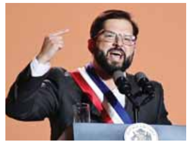
Chile's millennial president takes office with plans for change