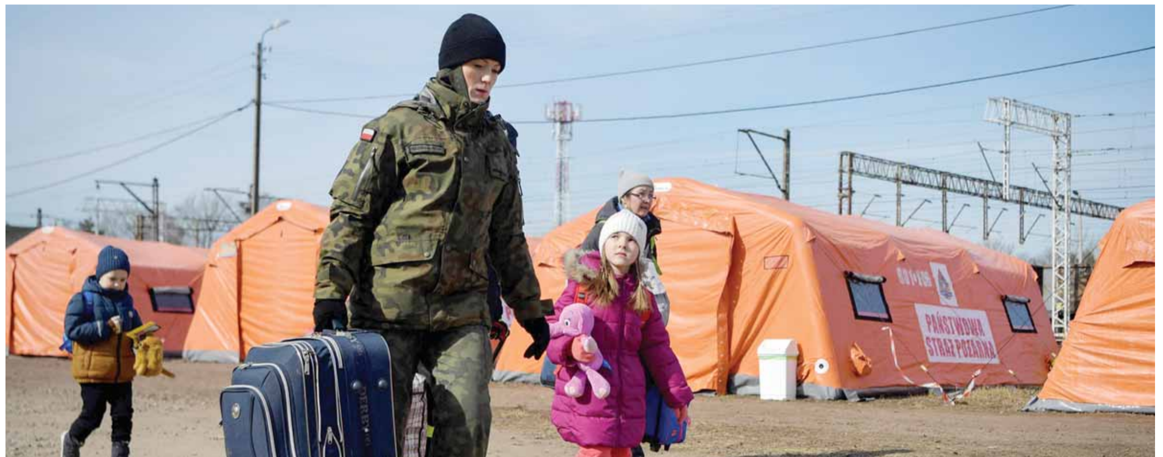
MEDYKA, Poland: A Polish soldier helps a family on their way to take a train at the Medyka border crossing after crossing the Ukrainian-Polish border yesterday.