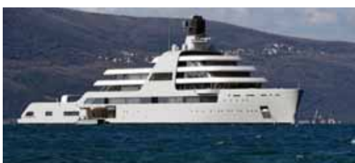
Superyacht Solaris, owned by the Russian oligarch Roman Abramovich, sails towards the luxury yacht marina Porto Montenegro yesterday.