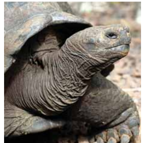
Handout picture shows a 'Chelonoidis chathamensis' turtle at the San Cristobal island, Galapagos islands, Ecuador.