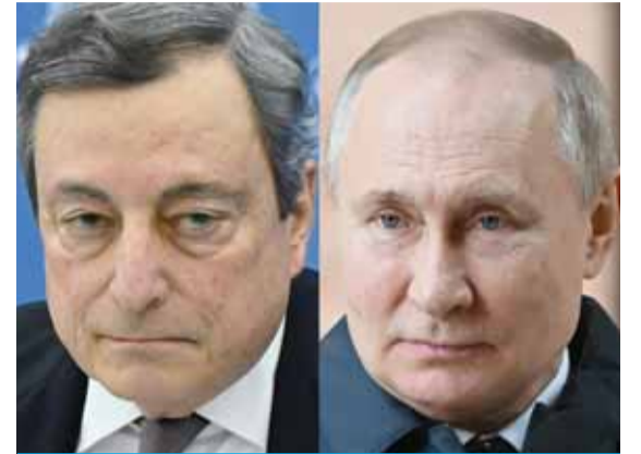
MOSCIW: This combination of pictures shows Italy's Prime Minister Mario Draghi (left) and Russian President Vladimir Putin.

"It will take us 24 to 30 months to become totally independent," Cingolani said. And while Draghi is betting on increasing renewable energy, he has not ruled out reviving the half-dozen coal-fired power plants still in operation but due to close in 2025. "To avoid a blackout, the only alternative is to use the capacity of coal-fired power plants," despite their harmful impact on the envi-