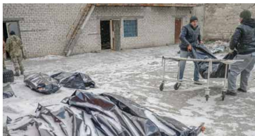
MYKOLAIV, Ukraine: Two men carry a corpse in a body bag to lay it next to others in a snow-covered yard in this city on the shores of the Black Sea on Friday.

An employee gently removes the chain around the neck of a corpse, which will be used for identification. Mykolaiv and its region have seen