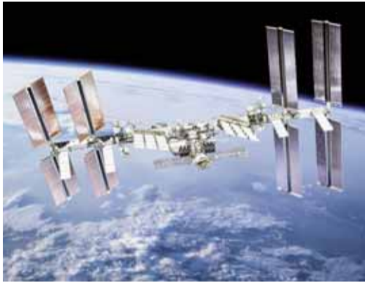
Space station could crash: Roscosmos

MOSCOW: Western sanctions against Russia could cause the International Space Station to crash, the head of Russian space agency Roscosmos warned yesterday. According to Dmitry Rogozin, the sanctions could disrupt the operation of Russian spacecraft servicing the ISS. As a result, the Russian segment of the station - which helps correct its orbit - could be affected, causing the 500-tonne structure to "fall down into the sea or onto land". Publishing a map of the locations where the ISS could possibly come down, he pointed out that it was unlikely to be in Russia. — AFP