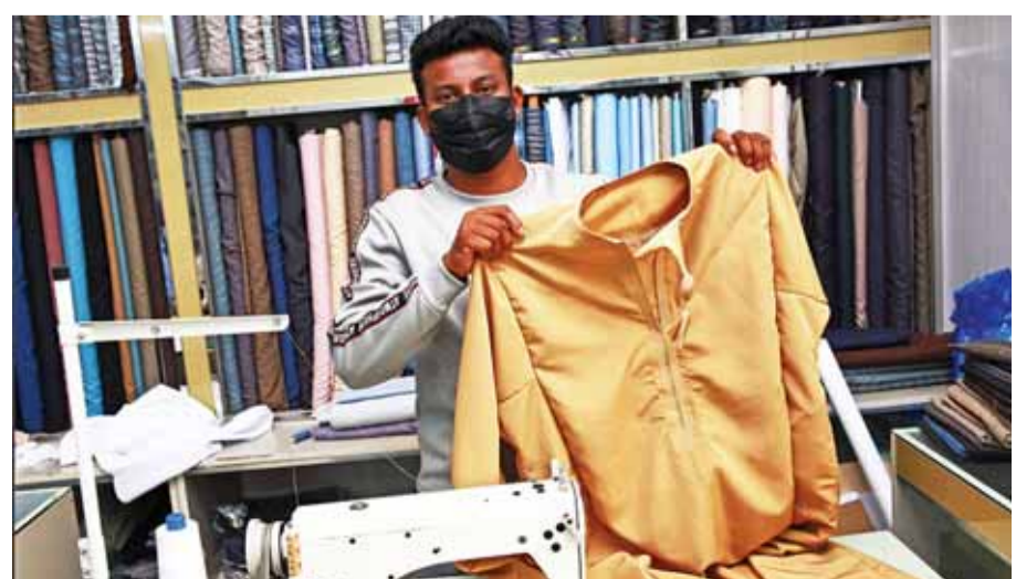
An Omani tailor displays a Dishdasha at a shop in the Omani capital Muscat.