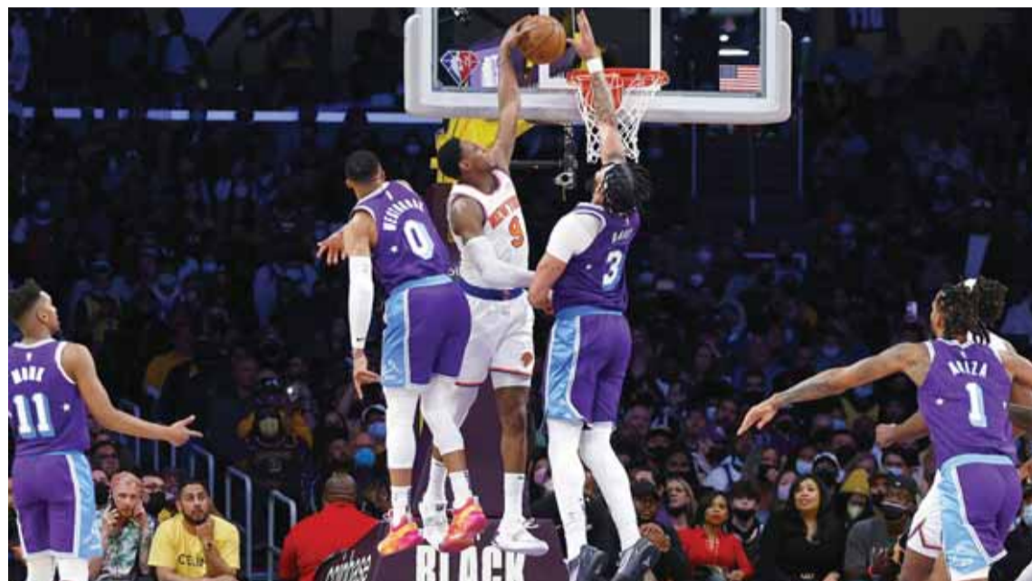
LOS ANGELES: RJ Barrett #9 of the New York Knicks makes a slam dunk against the Los Angeles Lakers in the fourth quarter at Crypto.com Arena on February 05, 2022.

The Lakers dominated the extra session, James setting a tone with a thundering dunk after a steal by Talen Horton-Tucker for a 113-111 edge. Julius Randle's two baskets accounted for all four of the Knicks' points in overtime. Barrett led the Knicks with a career-high 36 points. Former Laker Randle scored 32 points with 16 rebounds and seven assists, but the Knicks fell to 12th in the East, outside the post-season play-in berths.