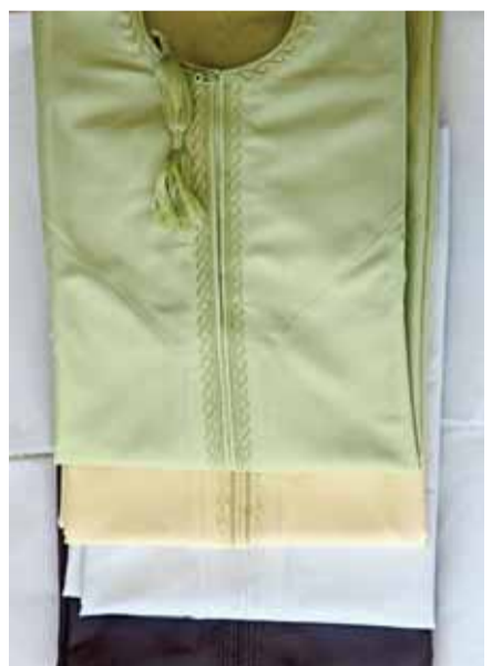
A Dishdasha hangs at a shop in the Omani capital Muscat.