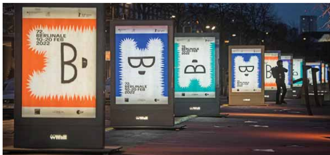
Advertising posters for the film festival in Berlin are pictured as preparations are under way for the film festival in Berlin.