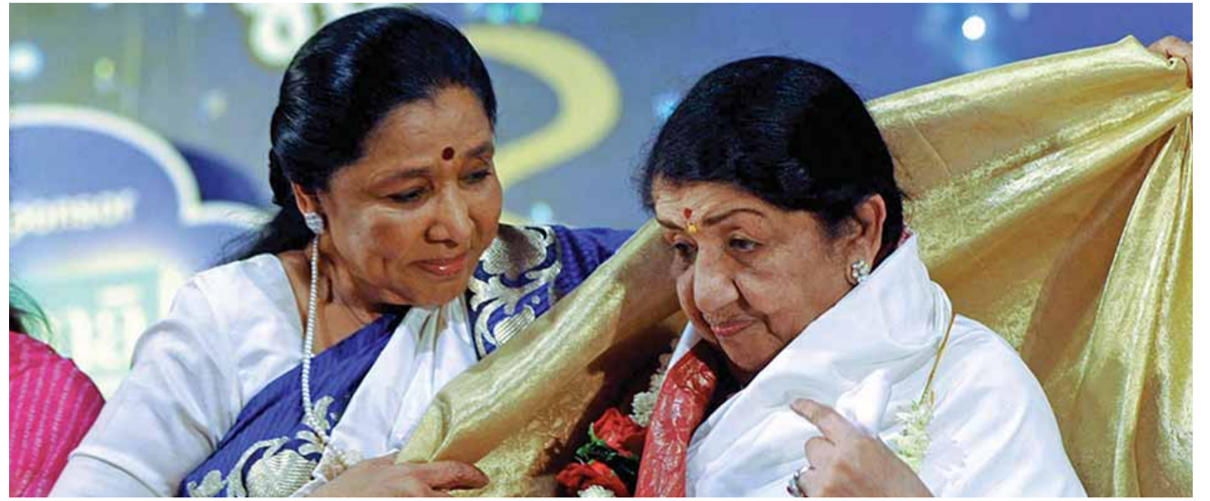
In this file photo taken on March 31, 2013 singer Lata Mangeshkar (right) is greeted by her sister Asha Bhosle during the Pandit Hridaynath Mangeshkar Awards in Mumbai.