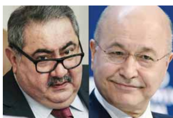
BAGHDAD: This combination of file photos show, then Iraqi finance minister Hoshyar Zebari during a press conference and Iraqi President Barham Saleh attending a session at the World Economic Forum (WEF) annual meeting in Davos.

"Its dissolution would mean the end of the separation of powers," it added. The president accused the CSM of corruption and of delaying politically sensitive investigations into the 2013 assassinations of left-wing opposition figures Chokri Belaïd and Mohamed Brahmi.