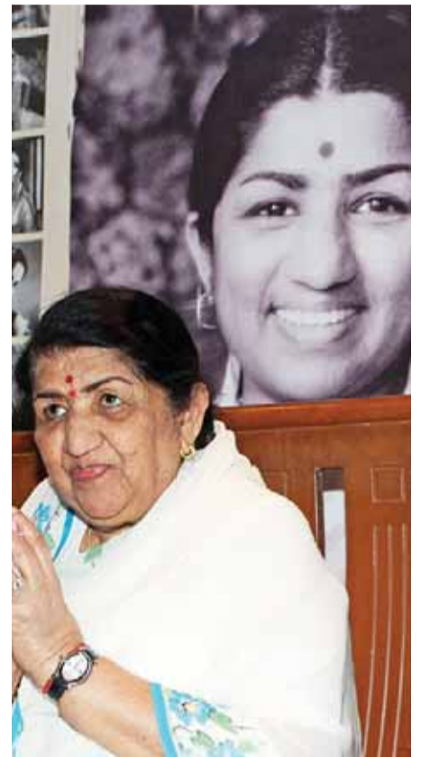
In this file photo taken on December 27, 2012 singer Lata Mangeshkar attends the launch of the 'Humsafar' 2013 calendar in Mumbai.

Though she dropped out of school, saying she only ever took classes for one day, Mangeshkar was fluent in several languages. Her oeuvre included devotional and classical albums and spanned around 27,000 songs in dozens of languages including English, Russian, Dutch and Swahili. — AFP