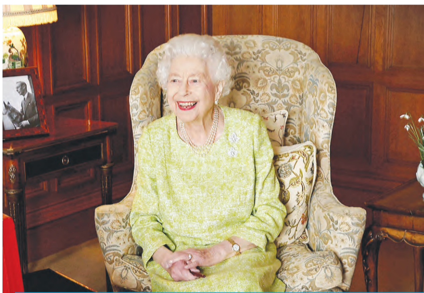
SANDRINGHAM: A Buckingham Palace handout image released yesterday shows Britain's Queen Elizabeth II smiling as she sits in Sandringham House on Feb 2, 2022, released to mark the start of her Platinum Jubilee Year.

Amir sends congratulations • Queen says Camilla should become Queen Consort