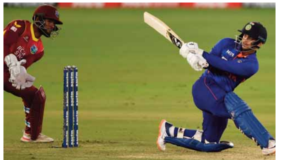
AHMEDABAD: India's Ishan Kishan (right) plays a shot during the first one-day international (ODI) cricket match between India and West Indies at the Narendra Modi Stadium in Motera yesterday.

Pace bowler Mohammed Siraj struck first in the third over to send back Shai Hope as an incoming delivery got the wicketkeeper-batsman's inside edge on to the stumps. India introduced spin in the eighth over and off-spinner Sundar soon made it count, dispatching Brandon King for 13. Chahal broke the West Indies' back with successive strikes but Holder avoided the hat-trick. Holder put on 78 runs with Fabien Allen, who made 29, to offer some resistance against India's onslaught.