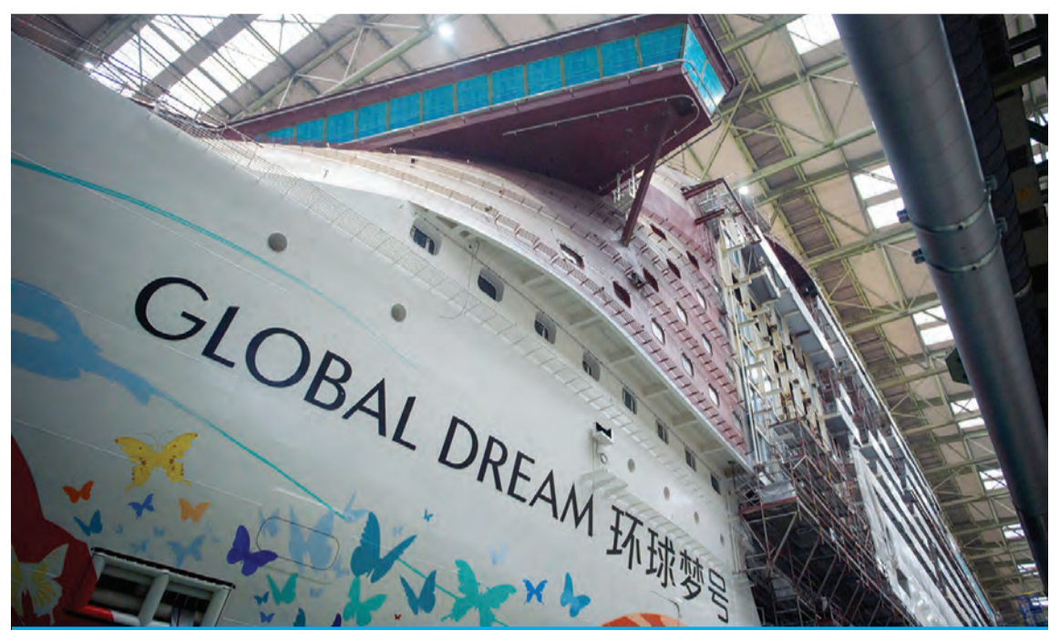
WISMAR, Germany: The 342m long and almost finished cruise ship "Global Dream" is pictured in the main assembly hall of the shipbuilder "MV Werften" in Wismar.

On Wismar's central square, hemmed by the colorful buildings typical of Hanseatic cities, Heike Reimann, 67, worried what impact the disappear-