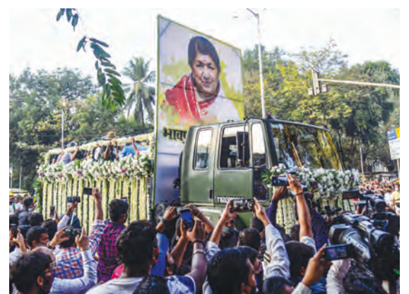
MUMBAI: People gather to catch a glimpse of the funeral procession of late Bollywood singer Lata Mangeshkar yesterday.

"Coming generations will remember her as a stalwart of Indian culture, whose melodious voice