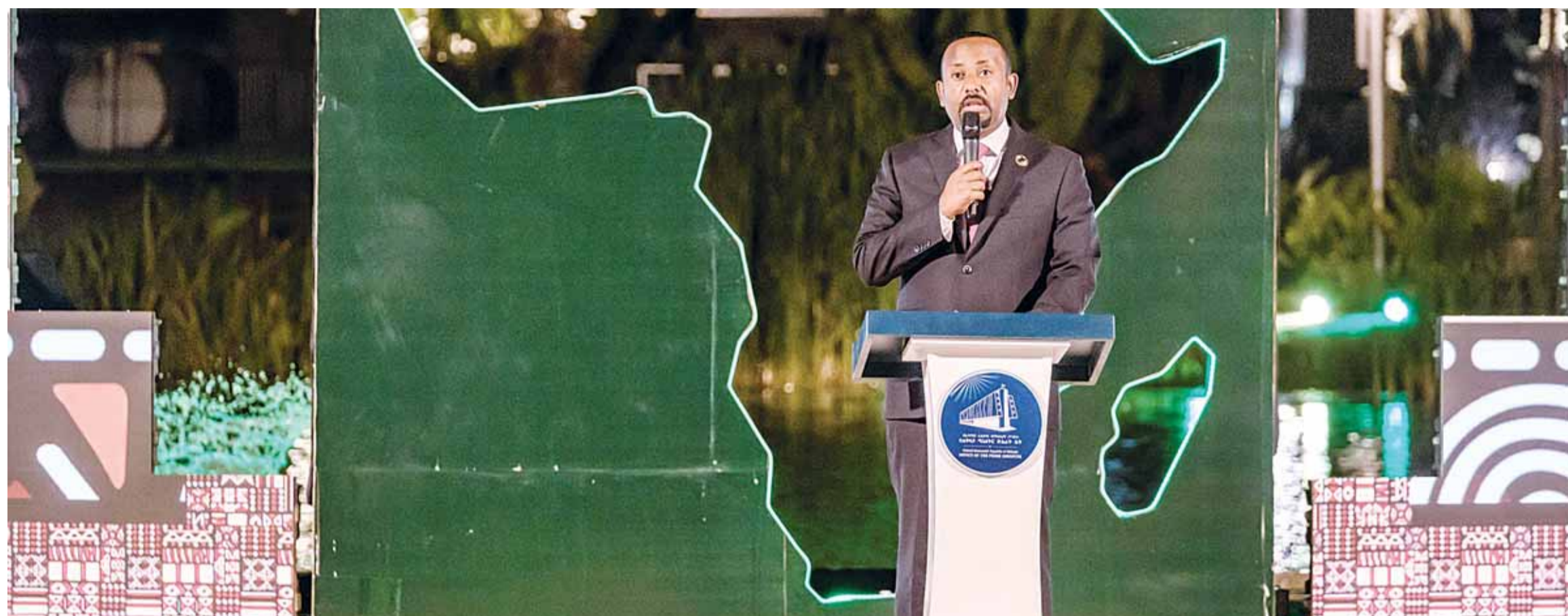
ADDIS ABABA: Ethiopia's Prime Minister Abiy Ahmed addresses the audience during a gala dinner by the government of Ethiopia for the participants of the 35th ordinary summit of the African Union on Saturday.