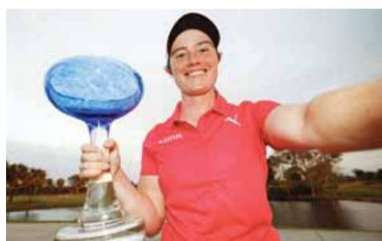
FLORIDA: Leona Maguire of Ireland imitates a 'selfie' as she poses with the trophy after winning the LPGA Drive On Championship at Crown Colony Golf & Country Club on February 05, 2022.

All-Star festivities began Friday night with the skills competition and included Sweden's Victor Hedman winning the hardest shot and St. Louis Blues forward Kyrou being crowned the fastest skater. They were followed by Saturday's three-on-three tournament featuring the four divisional teams playing games lasting two periods of 10 minutes each at the T-Mobile Arena, the home of the Vegas Golden Knights. The All-Star Game was not held last season because of the COVID-19 pandemic. Canada had the most players in the game with 17 followed by the USA, which had 16. Sweden and Russia both had three each. In the first game of the three-on-three tournament, Jack Hughes scored two late goals as the Metropolitan Division defeated the Pacific 6-4. The Metropolitan led 3-1 at the end of the first on goals by Tom Wilson, Giroux and Sebastian Aho. The Pacific came back to tie the score 3-3 in the second period on goals by Jonathan Marchessault and Jordan Eberle but the Metropolitan pulled away with the help of Hughes' markers.