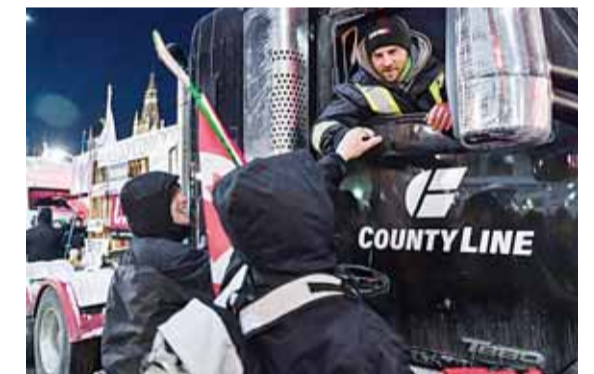
OTTAWA, Ontario: A supporter thanks a trucker on February 5, 2022 in Ottawa, Canada.