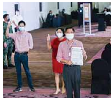
Philippines' raucous election campaign season to kick off