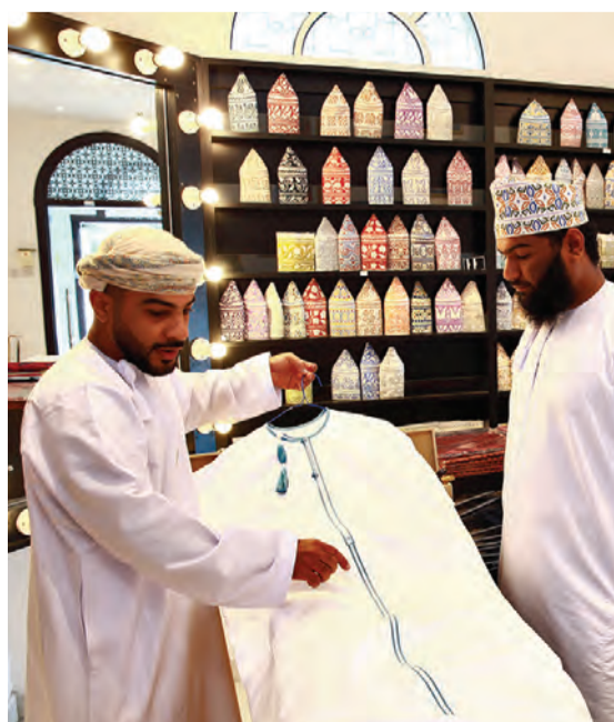
MUSCAT: An Omani tailor displays a dishdasha at a shop in the capital on Jan 10, 2022. — AFP

"The fabric must be a single color," a ministry official told AFP, adding that white or neutral colors were preferred. A person or manufacturer caught violating the dress code will be fined 1,000 Omani rials ($2,600), or double that in the case of a second violation. — AFP (See Page 11)