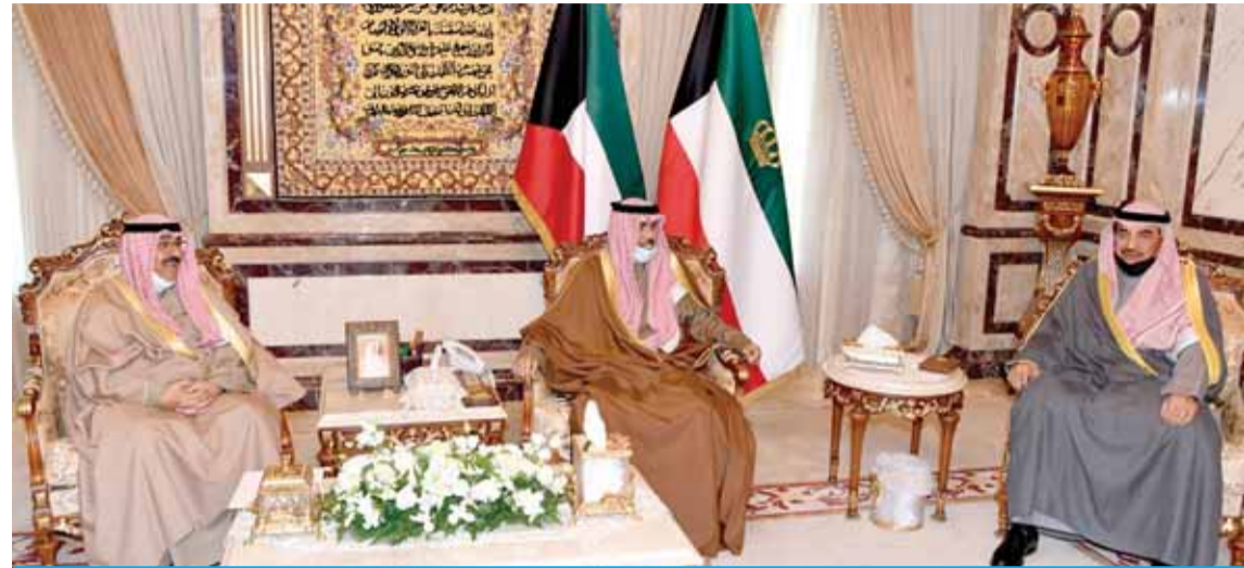
KUWAIT: His Highness the Amir Sheikh Nawaf Al-Ahmad Al-Jaber Al-Sabah meets His Highness the Crown Prince Sheikh Mishal Al-Ahmad Al-Jaber Al-Sabah and His Highness the Prime Minister Sheikh Sabah Al-Khaled Al-Hamad Al-Sabah.

Sheikh Nawaf receives congratulations on his safe return