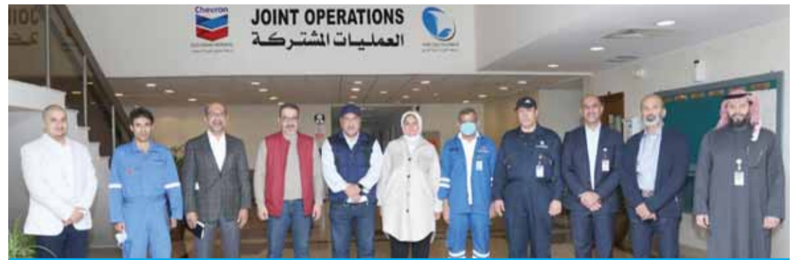
KUWAIT: Kuwaiti Deputy Prime Minister, Minister of Oil, Minister of Electricity and Water and Sustainable Energy Mohammad Al-Fares in a group picture during a field trip to the Divided Zone.

KUWAIT: Kuwaiti Deputy Prime Minister, Minister of Oil, Minister of Electricity and Water and Sustainable Energy Mohammad Al-Fares has stressed the Kuwait Petroleum Corporation's keenness on offering all possible means of support to the joint operations in the Kuwaiti-Saudi Divided Zone oil fields. This reflects the deep-rooted ties between both nations, Fares affirmed yesterday. A statement issued by KPC quoted the minister's remarks after his field trip to the Divided Zone, to inspect the latest projects and operations conducted by the Kuwait Gulf Oil Company (KGOC) and Chevron oil Company from the Saudi side. Both companies are