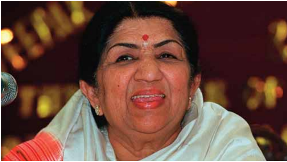
In this file photo taken on April 28, 1999 singer Lata Mangeshkar answers questions at a press conference in Mumbai.