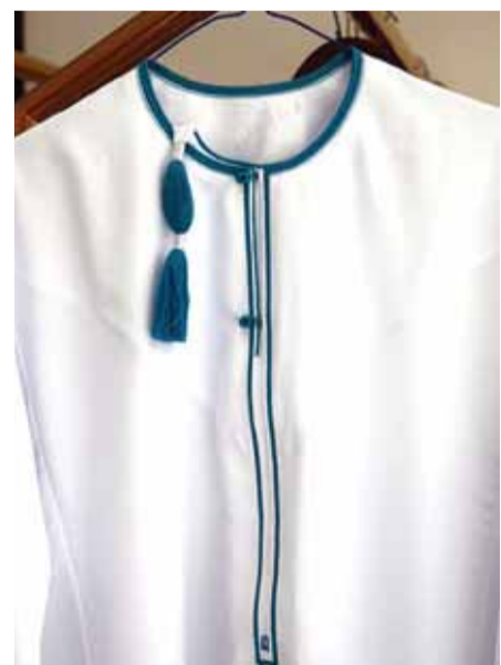
A Dishdasha hangs at a shop in the Omani capital Muscat.