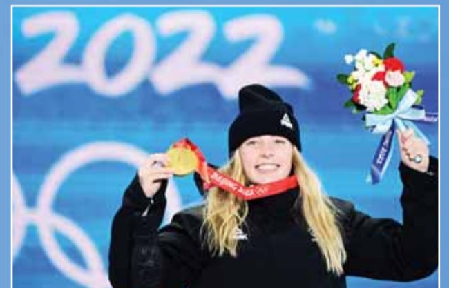
ZHANGJIAKOU: New Zealand's Zoi Sadowski Synnott competes in the snowboard women's slopestyle final run during the Beijing 2022 Winter Olympic Games at the Genting Snow Park H & S Stadium yesterday. (Inset) Gold medalist Sadowski Synnott celebrates on the podium.

BEIJING: "Super-proud" snowboarder Zoi Sadowski Synnott made history yesterday after winning New Zealand's first ever Winter Olympic gold but the men's downhill skiers were forced to wait 24 hours for their chance. Seven golds were up for grabs on the second full day of competition in Beijing. Seven became six when the men's downhill—one of the most closely watched events at any Winter Olympics—was postponed until Monday because of gusty winds.