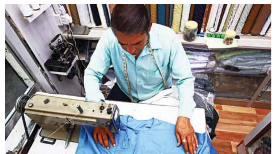
A tailor manufactures a Dishdasha at a shop in the Omani capital Muscat.