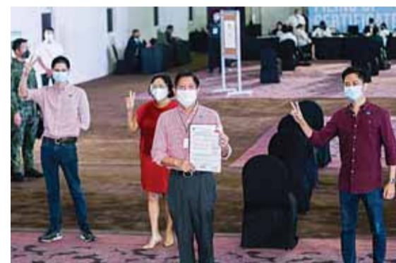
PASAY, Philippines: File photo shows former Philippine senator Ferdinand "Bongbong" Marcos Jr, son of former dictator Ferdinand Marcos, along with his family members posing for photos after filing his candidacy for the country's 2022 presidential race.

Guterres "expressed the wish for enhanced cooperation between the United Nations and the People's Republic of China in all the pillars of the Organization's work — peace and security, sustainable development, including climate change and bio-