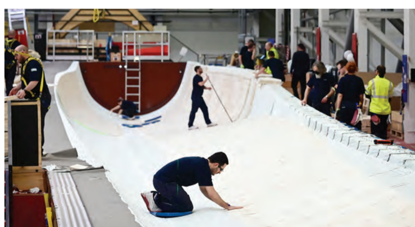
KINGSTON UPON HULL, United Kingdom: A wind turbine blade is manufactured at the Siemens Gamesa blade factory in Hull, northeast England.

The hub has since manufactured 1,500 hand-made turbine blades and now employs more than 1,000 people. Prime Minister Boris Johnson, host of last November's UN climate change summit in Glasgow, has vowed to "level up" economic opportunity in places like Hull, which voted overwhelmingly for Brexit. Siemens Gamesa built the £310-million plant jointly with