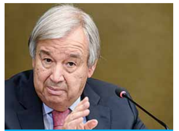
UN Secretary-General Antonio Guterres

At the meeting with Xi, Guterres "expressed the wish for enhanced cooperation between the United Nations and the People's Republic of China in all the pillars of the Organization's work — peace and security, sustainable development, including climate change and bio-