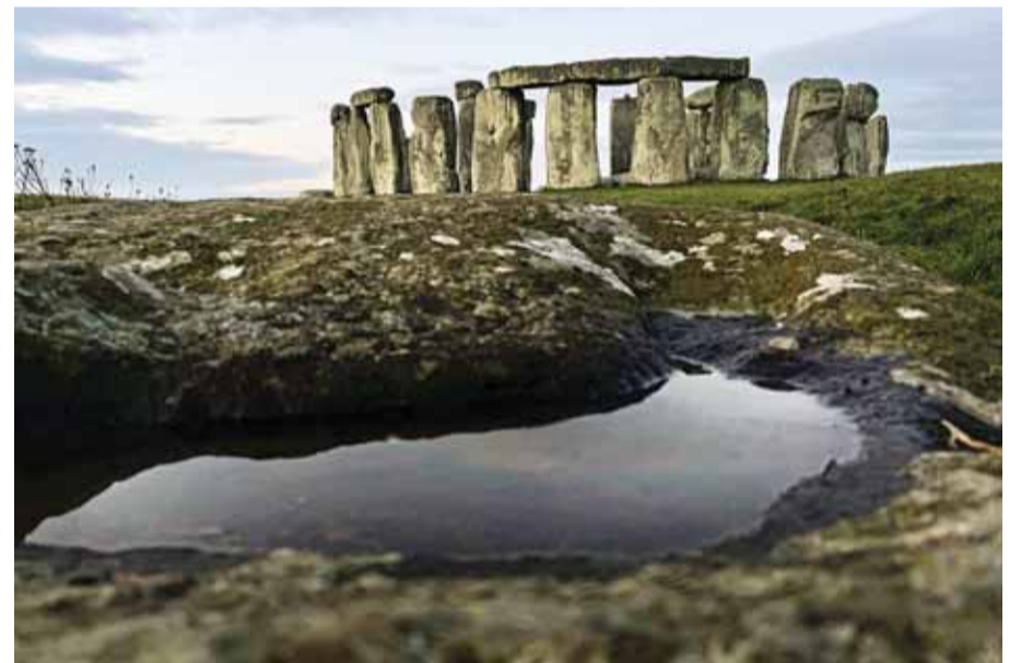
The sun rises at the prehistoric monument Stonehenge near Amesbury in southern England.

exhibition will show how recent discoveries using DNA and material analysis are consigning to history the idea that Stonehenge's builders were primitive. Instead, it presents them as skilled artisans who were already displaying sophisticated understanding and techniques by 2,500 BC.