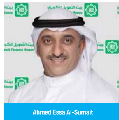
Ahmed Essa Al-Sumait

Al-Sumait said that KFH was able to achieve a great spread and remarkable development in 2021, due to its leadership in the sukuk market, as several Islamic and conventional financial institutions were stimulated to enter the market and participate in trading. He pointed out that the volume of sukuk trading came as a result of several factors, including sovereign issuances in the (GCC) countries to gap the budget deficit as a result of the drop in oil prices, as well as the low profit rates that made the