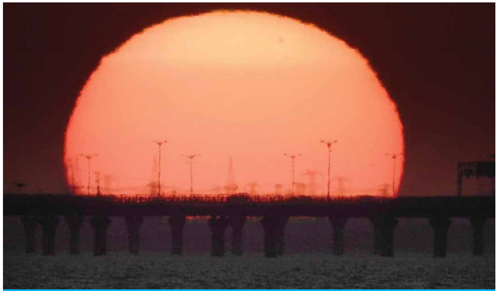
KUWAIT: The sun sets behind Sheikh Jaber Causeway in Kuwait City yesterday.