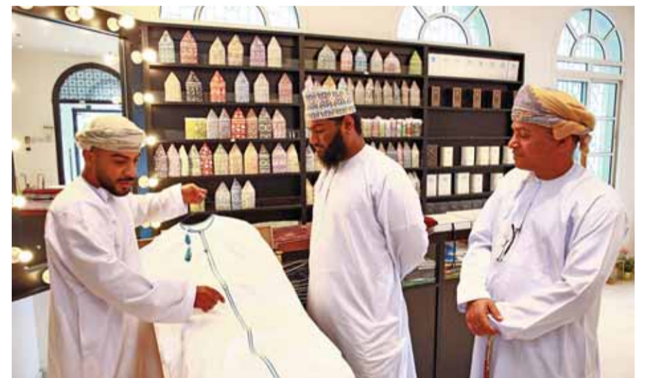
An Omani tailor displays a Dishdasha at a shop in the Omani capital Muscat.

Omani men usually wear an embroidered brimless round cap (kumma) or a turban-style headdress, known as the massar, to complete their look. The striking ensemble is a distinctive part of life in Oman, an ancient land known for its rich heritage, scenic coasts and stunning mountains.