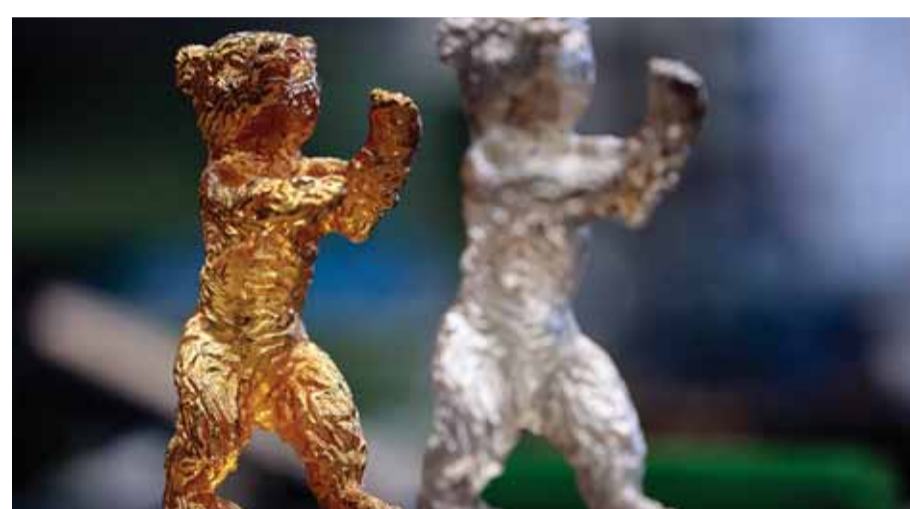
In this file photo a golden and a silver Berlinale Bear trophy of the upcoming 72nd International Film Festival Berlinale are pictured at the Noack foundry in Berlin.

The Berlinale ranks among Europe's top festivals alongside Cannes and Venice, which also went live last year but during ebbs in the pandemic. The recent Sundance and Rotterdam festivals were forced by COVID to go entirely virtual and many expected Berlin to follow suit. But after an all-online festival last March, followed by outdoor screenings in the summer, the Berlinale worked with authorities