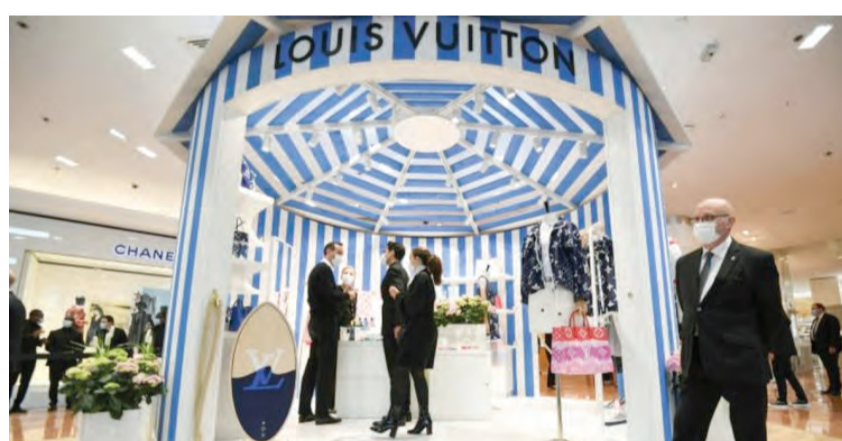
PARIS: In the extravagant world of the French luxury industry, brands used to prefer destroying their unsold goods rather than offering their high-priced products at a discount.

At its competitor LVMH, the world's largest luxury group that includes Louis Vuitton, Dior, and Celine among many others, environmental develop-