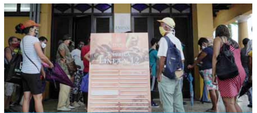
HAVANA: Cuban people line up for food as the country endures economic woes marked by rampant inflation.

ranked as the top primary dealer in the ILM sukuk program. Also, KFH achieved the top rank dealer in the secondary market in 2021. It is an unprecedented event that a financial institution occupies the top rank dealer for the ILM Sukuk Program in both primary and secondary markets.