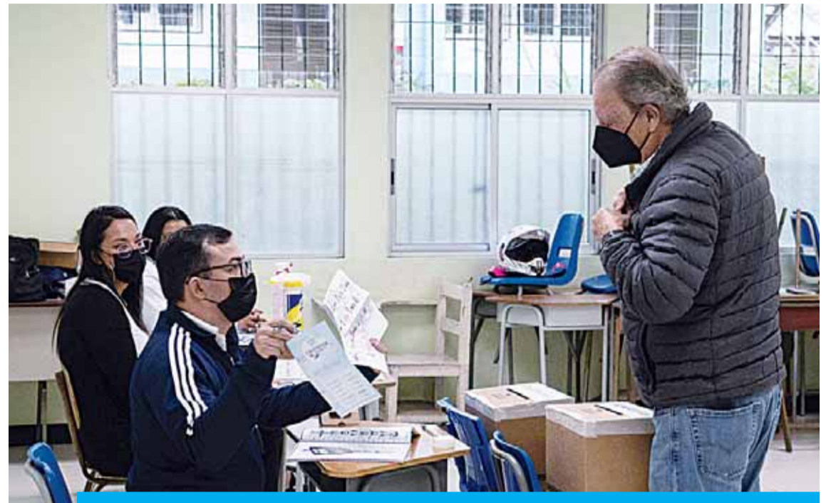
SAN JOSE, San José Province: A man votes during general elections in San Jose, yesterday. Costa Ricans headed to the polls yesterday with a crowded presidential field and no clear favorite for tackling growing economic concerns in one of Latin America's stablest democracies.

Candidate needs 40 percent of the vote to win outright