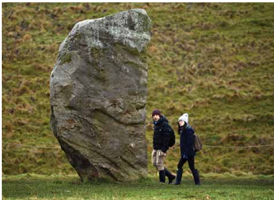
People walk past a stone that forms part of the Stone Circle in Avebury, southern England.

"That idea of being a farmer comes to England, to Britain, from the continent," he explained. "So we're following that through the objects that moved along." These include an axe head made from green jadeite, mined 1,300 kilometers away in the Italian Alps, and brought to the region 6,000 years ago. "The exhibition will illustrate these long-distance connections," said Wilkin. The