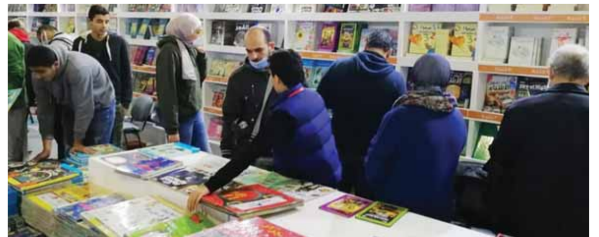
CAIRO: Visitors are seen at the Cairo Book Fair.