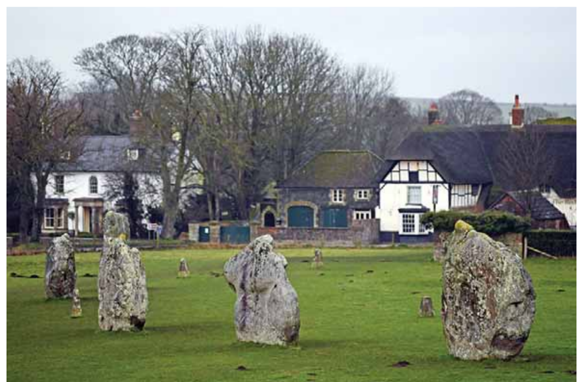
Stones that form part of the Stone Circle are pictured in Avebury.