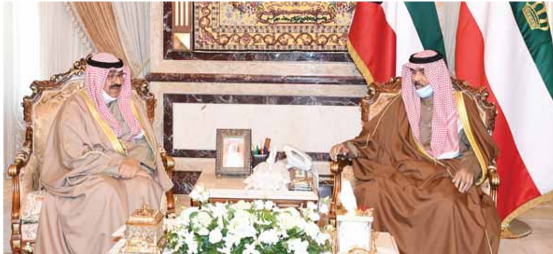
His Highness the Amir Sheikh Nawaf Al-Ahmad Al-Jaber Al-Sabah meets His Highness the Crown Prince Sheikh Mishal Al-Ahmad Al-Jaber Al-Sabah.