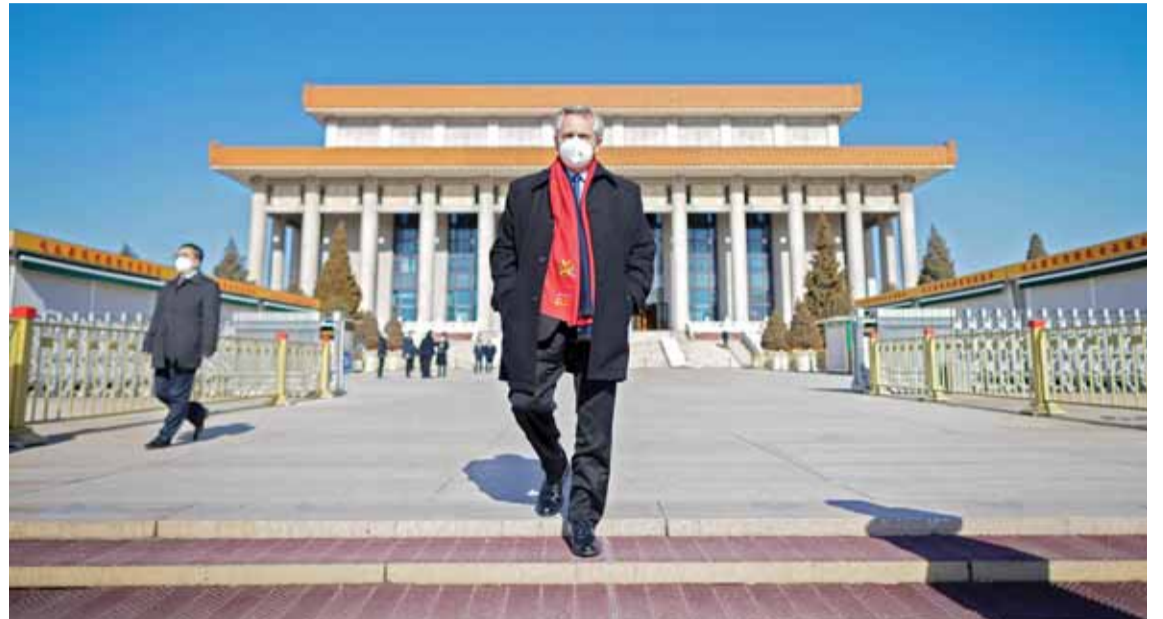
BEIJING: Argentine President Alberto Fernandez during his official visit in Beijing.

The statement was a vivid illustration of how Russia and China have forged closer ties in recent years as tensions rise with the West on a host of security issues, including the future of Ukraine and Taiwan. Twenty-one world leaders attended the Games, an event Beijing hopes will burnish its international image, but the sporting spectacle has been clouded by a Western diplomatic boycott over China's rights record. A majority of the leaders who came for the Games rule over non-democratic regimes, according to the Economist Intelligence