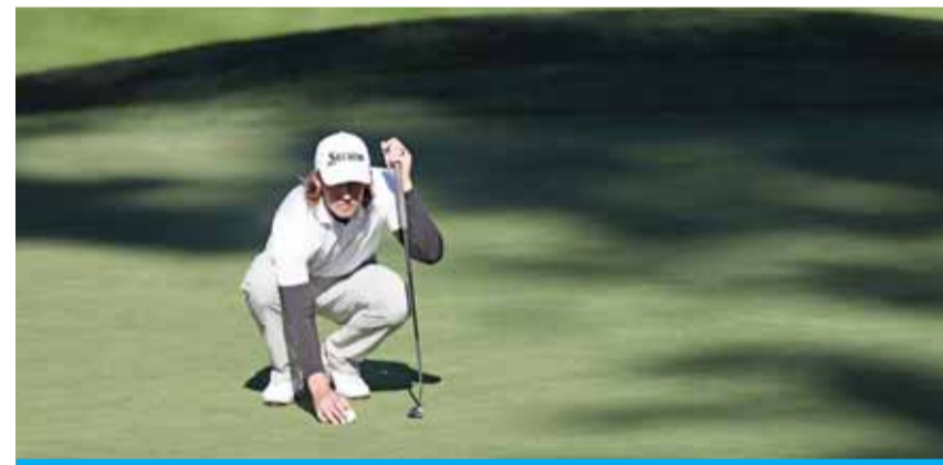
CALIFORNIA: Andrew Putnam of the United States looks on over the 17th green during the second round of the AT&T Pebble Beach Pro-Am at Spyglass Hill Golf Course in Pebble Beach, California.

Alex and Maguire shared the lead when the final