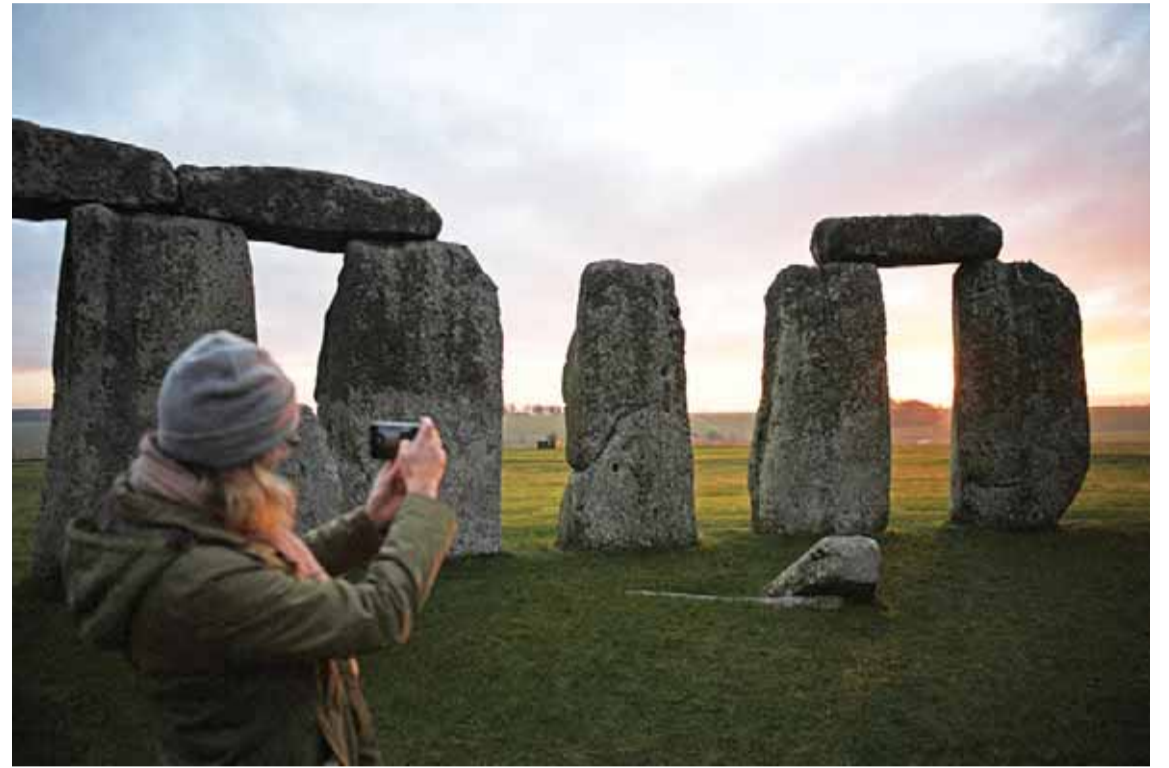
The sun rises at the prehistoric monument Stonehenge near Amesbury in southern England.