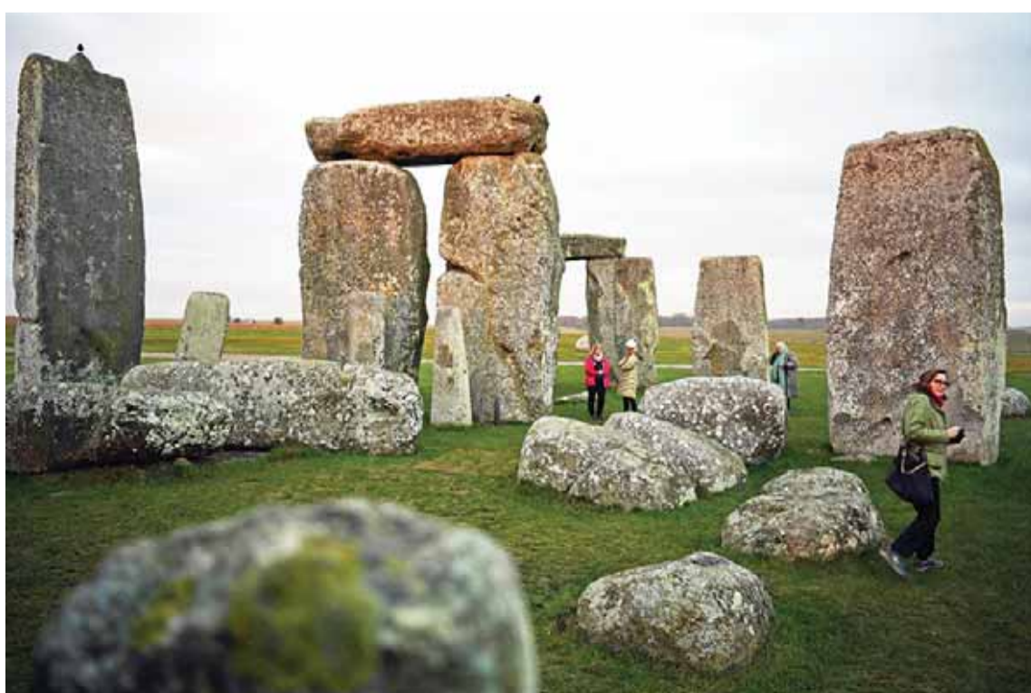
People visit the prehistoric monument Stonehenge near Amesbury in southern England.

But the site has never ceased to fascinate and each generation has assigned it a new and mystical purpose. Many centuries later, thousands gather at the site as Celtic Druids celebrate the winter and summer solstices. "There is not just one Stonehenge but many," said Wilkin.—AFP