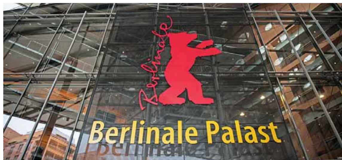
The Berlinale Bear, logo of the Berlinale Film Festival, is seen at the Berlinale Palace as preparations are under way for the film festival in Berlin.