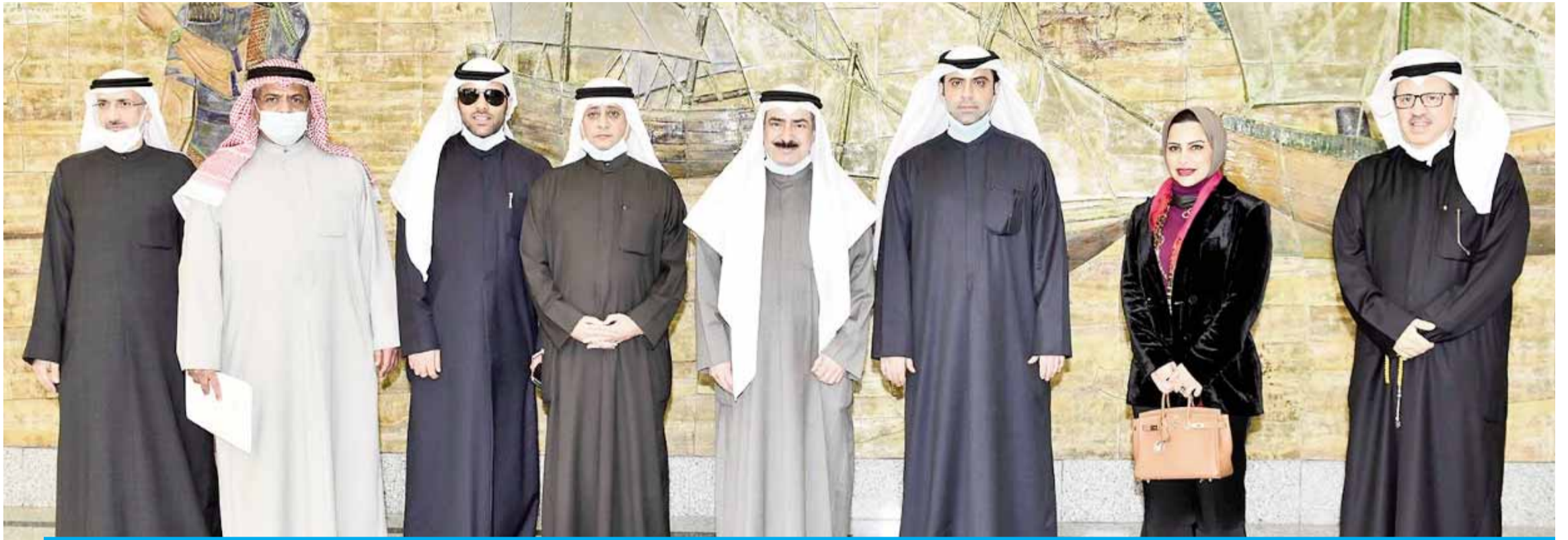
KUWAIT: Pictures taken from Information Minister Hamad Rouh El-Din's visit to the National Council for Culture, Arts and Letters.

Rouh El-Din vows to develop national news agency