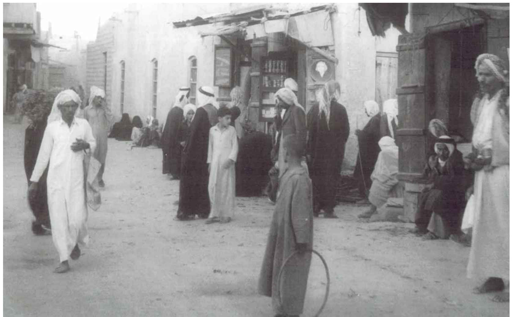
KUWAIT: This picture shows a traditional old market in Kuwait.