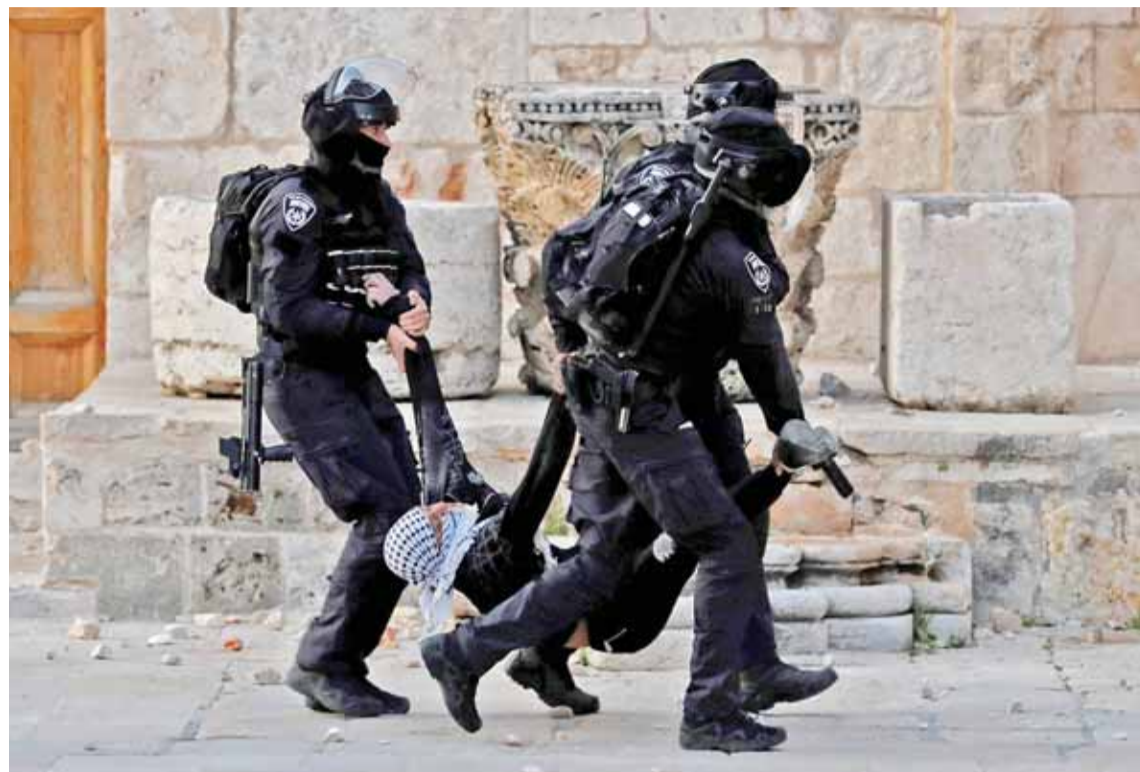
JERUSALEM: Zionist police arrest a Palestinian man at Jerusalem's Al-Aqsa Mosque on April 22, 2022.

The communique also stressed the relevant UN resolutions, including the legal advisory opinion of the International Court of Justice in 2004. The meeting lauded steadfastness of Palestinian peo-