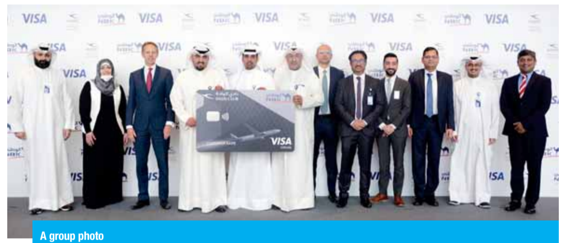
A group photo

Visitors who are planning to celebrate Eid in Kuwait with family and friends can spend more time experiencing the city with the Kuwait Getaway offer, which gives guests who book two or more nights' stay a 15 percent discount on their room rate. For locals who are looking to book a staycation, the Hotel also offers a generous Kuwait Residents package. Meanwhile, guests who wish to enjoy an extra touch of luxury this Eid can indulge in the comfort of a spacious suite and receive a 25 percent discount with the Suite Dreams offer.