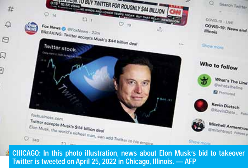
CHICAGO: In this photo illustration, news about Elon Musk's bid to takeover Twitter is tweeted on April 25, 2022 in Chicago, Illinois.