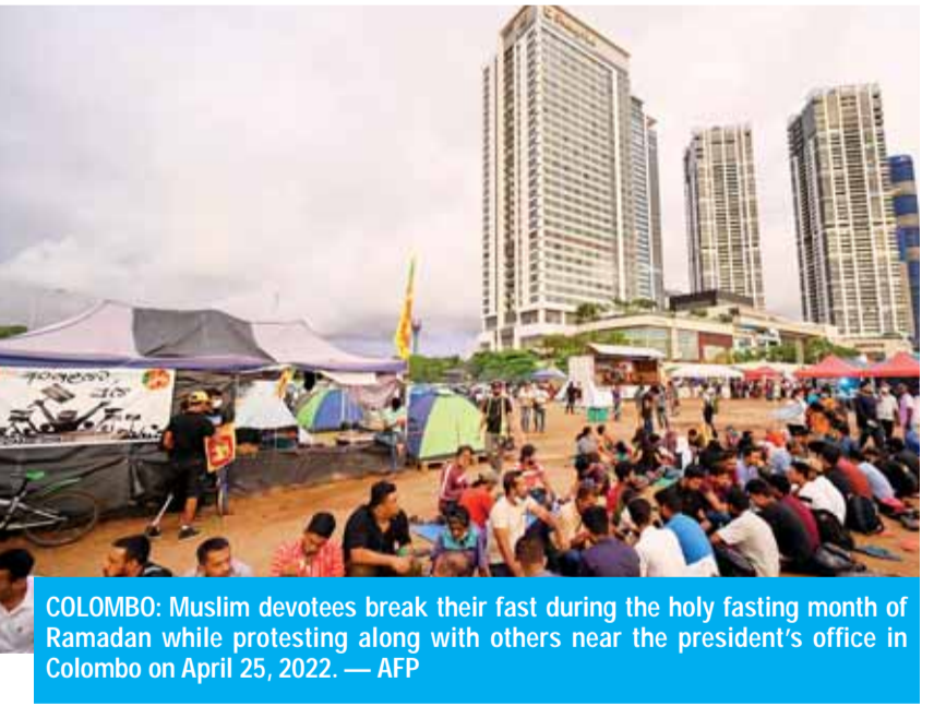
COLOMBO: Muslim devotees break their fast during the holy fasting month of Ramadan while protesting along with others near the president's office in Colombo on April 25, 2022.