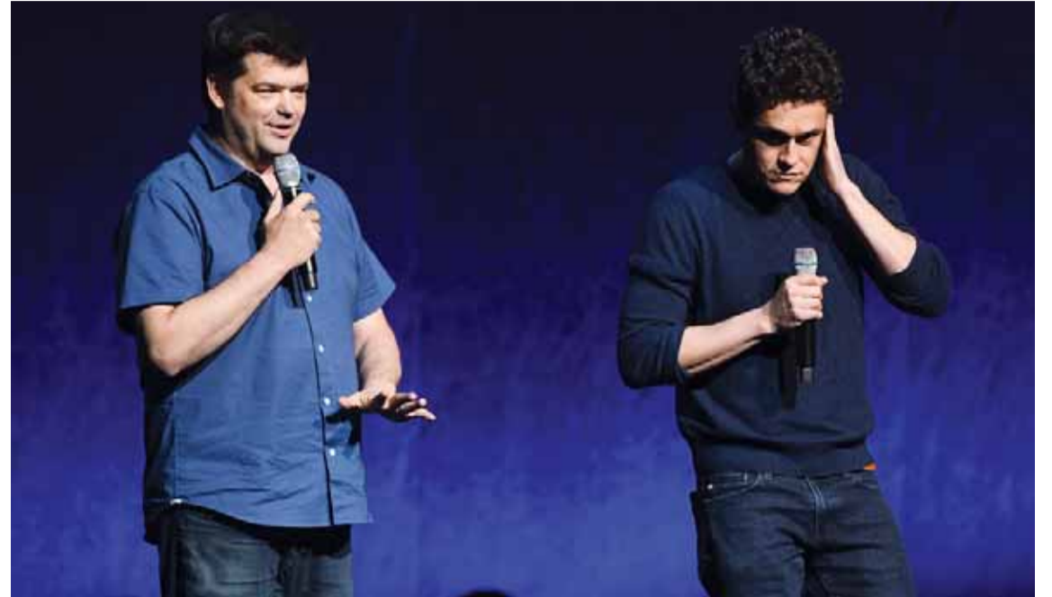
US filmmakers Phil Lord and Chris Miller speak during the Sony Pictures Entertainment exclusive presentation of its upcoming releases during CinemaCon.

Hollywood bosses showcased new "Spider-Man" sequels and brought rap superstar Bad Bunny on stage to kick off a bullish meeting of movie theater industry leaders in Las Vegas Monday. The CinemaCon summit draws Tinseltown executives to giant casino ballrooms each year, where owners of theaters-from global chains to tiny independents-are treated to never-before-seen footage and A-list appearances. After a subdued edition last August, big-screen operators were back in a buoyant mood, with box office hauls now recovering from successive COVID-hit years-not to mention news that streaming juggernaut Netflix recorded its first subscriber loss in more than a decade.