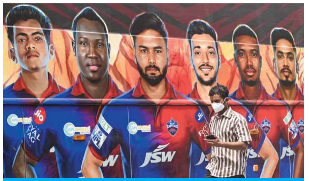
MUMBAI: A pedestrian walks past the bus of Indian Premier League's (IPL) Delhi Capitals on March 24, 2022.

Mumbai Indians and defending champions Chennai Super Kings have won nine of the 14 IPL titles since the league was launched. But the powerhouse teams are languishing at the bottom of the