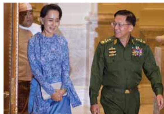
NAYPYIDAW: File photo shows Aung San Suu Kyi (C) and Myanmar's military chief Senior General Min Aung Hlaing (R) arrive for a handover ceremony at the presidential palace in Naypyidaw. Myanmar junta court on April 26, 2022 postponed giving its first verdict in the corruption trial of ousted leader Aung San Suu Kyi. —AFP

"The fundamental mission of our nuclear forces is to deter a war, but our nukes can never be confined to the single mission of war deterrent," he said, according to the KCNA transcript. North Korea had paused long-range and nuclear tests while Kim met then-US president Donald Trump for a bout of doomed diplomacy, which collapsed in 2019. —AFP