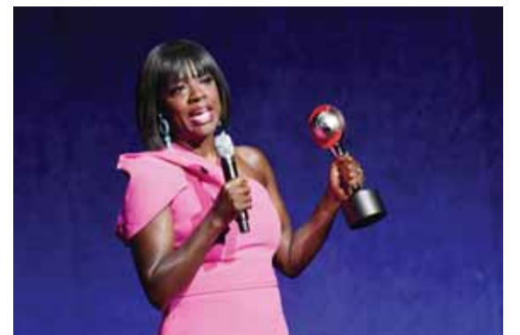
CinemaCon Trailblazer of the Year US actress Viola Davis speaks during Sony Pictures Entertainment exclusive presentation of its upcoming releases during CinemaCon.