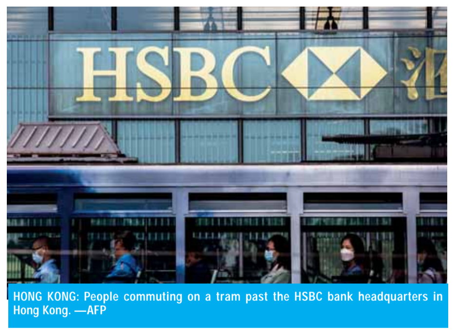
HONG KONG: People commuting on a tram past the HSBC bank headquarters in Hong Kong.

percent on London's rising FTSE 100 index in reaction to the earnings update. Richard Hunter, head of markets at Interactive Investor, described the return of loss provisions as "an unfortu-