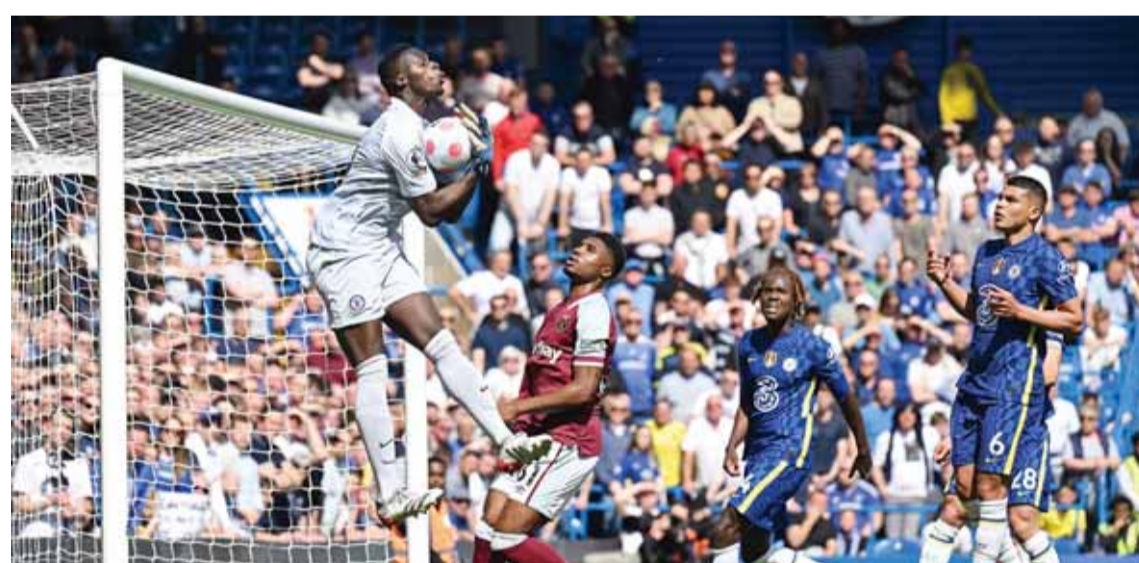
LONDON: Chelsea's French-born Senegalese goalkeeper Edouard Mendy jumps to gather the ball from a deflected shot during an English Premier League match between Chelsea and West Ham United at Stamford Bridge on April 24, 2022.

Sports minister Nigel Huddleston said: "The message to the Premier League is quite clear - they need to act sooner rather than later because, other-