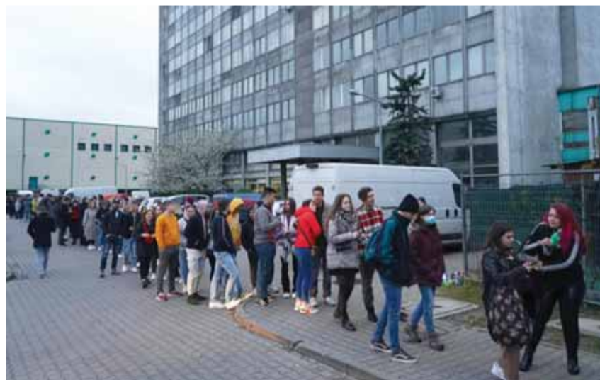
Fans stand in line to enter the venue of an anti-war concert of Russian musicians for more than a thousand fans, mainly Ukrainians and Belarusians, in Warsaw, Poland.

TalkTV is airing on regular television in Britain and on streaming platforms, as well as YouTube. Morgan's show will also be shown on Fox Nation in the United States and Sky News Australia, both of which are part of Murdoch's global media empire. TalkTV uses a stable of journalists from Murdoch's News UK operation, including The Times and The Sun, and will show video broadcasts of the group's existing TalkRadio. The company launched another radio station, Times Radio, in June 2020 as an alternative to the BBC's news and current affairs station Radio 4. —AFP