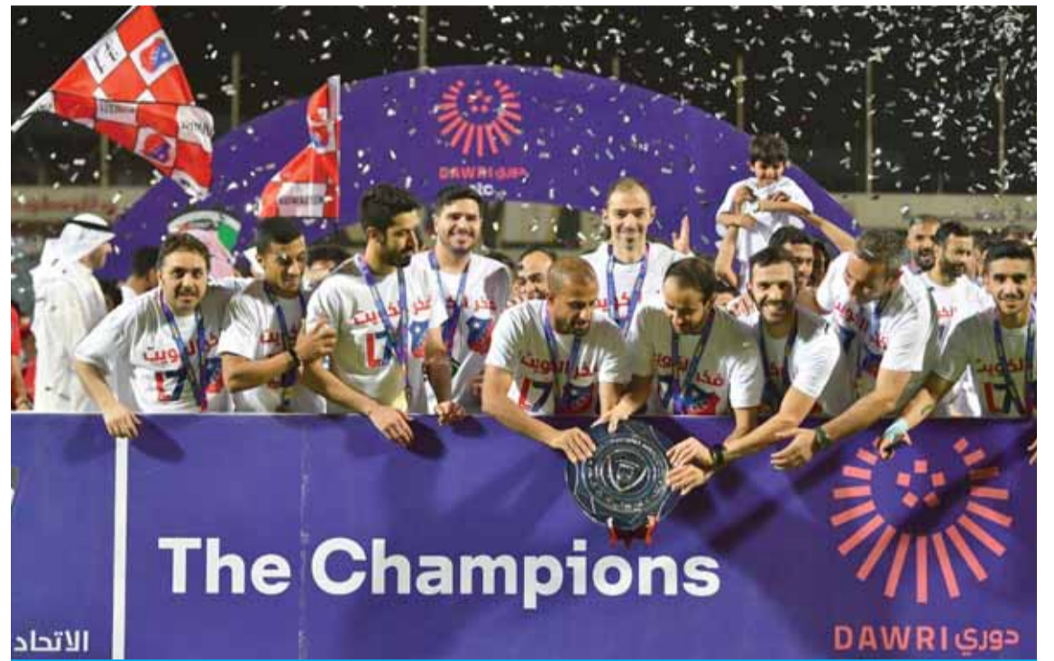
KUWAIT: Kuwait SC players celebrate with the Dawri trophy.