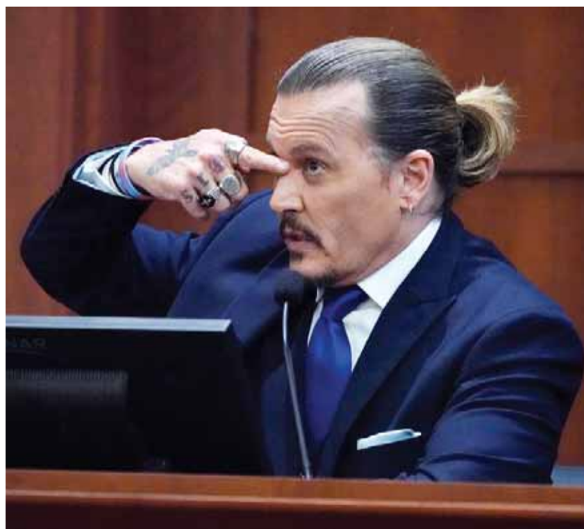
Actor Johnny Depp testifies that a actress Amber Heard threw, hit him there, in the courtroom at the Fairfax County Circuit Courthouse in Fairfax, Virginia.