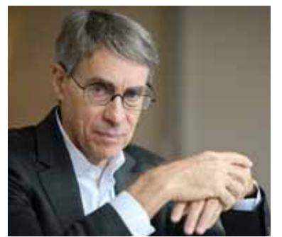
Human Rights Watch chief to step down