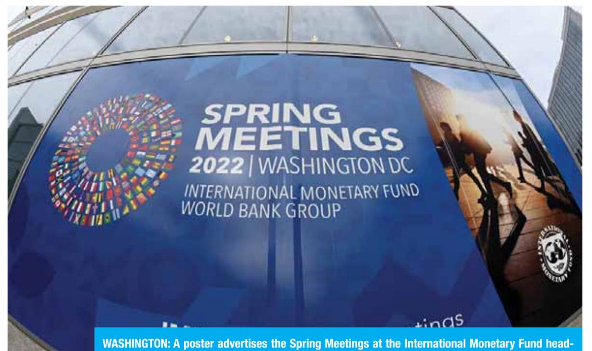
WASHINGTON: A poster advertises the Spring Meetings at the International Monetary Fund headquarters in Washington, DC on April 21, 2022. —AFP

"Slower growth and rising prices, coupled with the challenges of war, infection and tightening financial conditions, will exacerbate the difficult policy trade-off between supporting recovery and containing inflation and debt," the blog said. —AFP