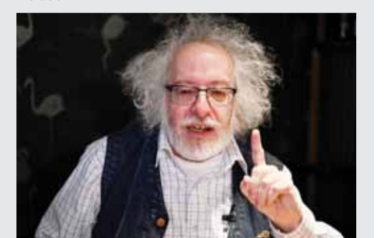
MOSCOW: Russian journalist and former editor of the Ekho Moskvy radio station, Alexei Venediktov, attends an AFP interview in Moscow.

"I understand (Putin's) logic: he could not keep us because propaganda during such operations must be total," Venediktov said. Russia in March also introduced prison terms of up to 15 years for publishing information about the army deemed false by the government and in late April Venediktov was designated a "foreign agent". Last month, he posted images online of a pig's head wearing a curly wig that was left outside his apartment and an anti-Semitic sticker glued to his door.