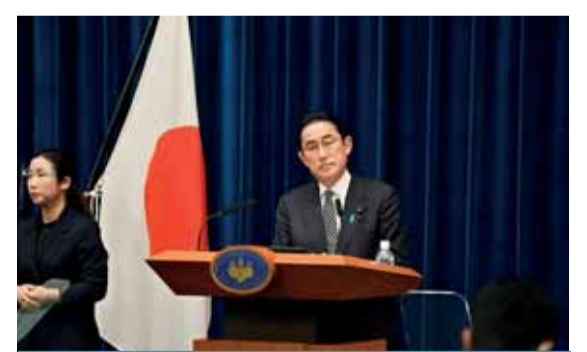
TOLYO: Japanese households and businesses are being squeezed by rising prices and surging energy costs.