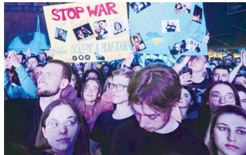
Spectators hold up posters against the war in Ukraine during an anti-war concert of Russian musicians for more than a thousand fans, mainly Ukrainians and Belarusians, in Warsaw, Poland.

Russian rapper Noize MC bounds onto the brightly lit stage in Warsaw to the screams of hundreds of adoring fans at his anti-war concert. After an emotional speech denouncing the Kremlin's sweeping military operation in Ukraine, he flashes a peace sign with his fingers to the mostly Ukrainian but also Russian and Belarusian audience. "I will be making this sign until my hands are tied behind my back," Noize MC told the crowd, alluding to alleged Russian atrocities in Ukrainian towns such as Bucha, where bodies were found with their hands bound behind their backs.