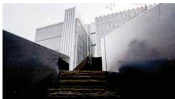
WASHINGTON: This file photo taken on April 13, 2022, shows the World Bank headquarters. —AFP

Although very popular with major manufacturers, electric vehicles currently only represent a small percentage of total car sales worldwide. In the electric sector, GM collaborates with Japanese car maker Honda. At the beginning of April, they announced that they would co-develop a new line of electric vehicles at "affordable" prices, with production due to begin in 2027. —AFP