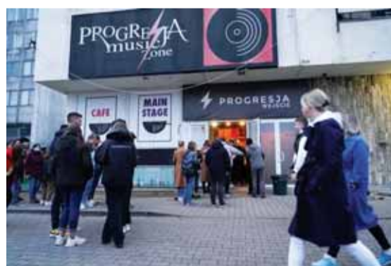
Fans stand in line to enter the venue of an anti-war concert of Russian musicians for more than a thousand fans, mainly Ukrainians and Belarusians, in Warsaw, Poland.

"I'm talking about war without synonyms," she told AFP, defying a Kremlin order that Russians can refer to the fighting only as a "special military operation." At the same time,