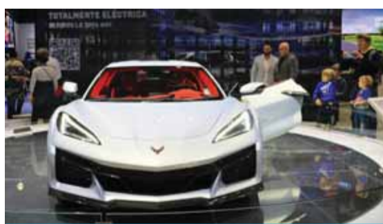
A Corvette Z06 on display at the New York International Auto Show in April, 2022 in New York City; GM says it will start offering an electric version of the car in 2023