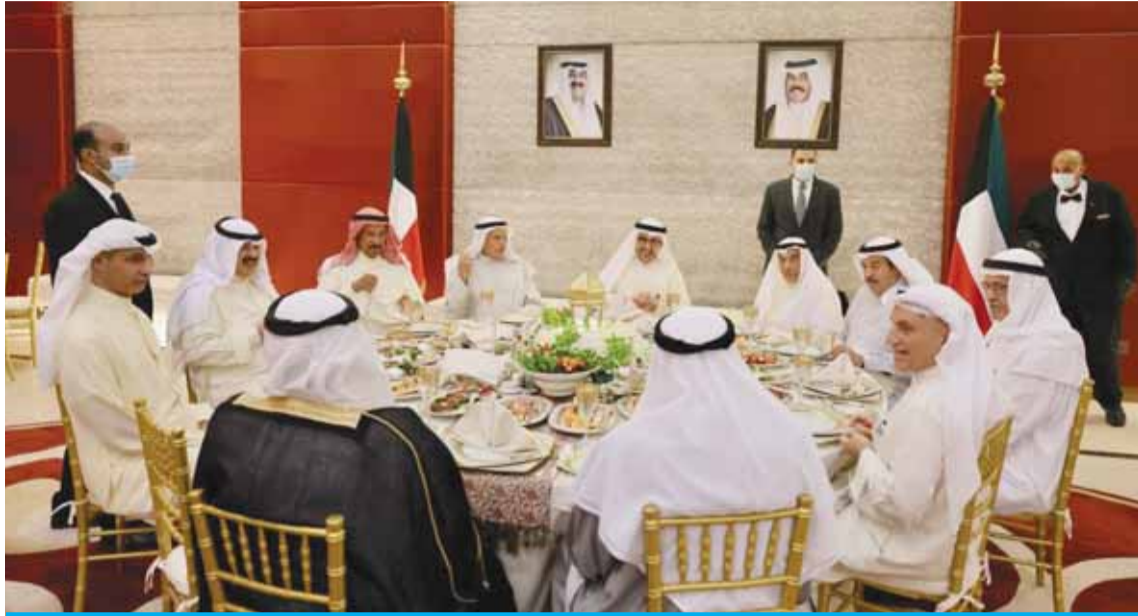
KUWAIT: Foreign Minister Sheikh Dr Ahmad Nasser Al-Mohammad Al-Sabah is seen during a 'sohour' banquet held in honor of the retired ambassadors and officials of the ministry.