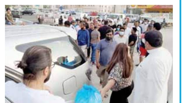
KUWAIT: People line up to receive food boxes during an iftar distribution campaign in Salmiya in the holy month of Ramadan.