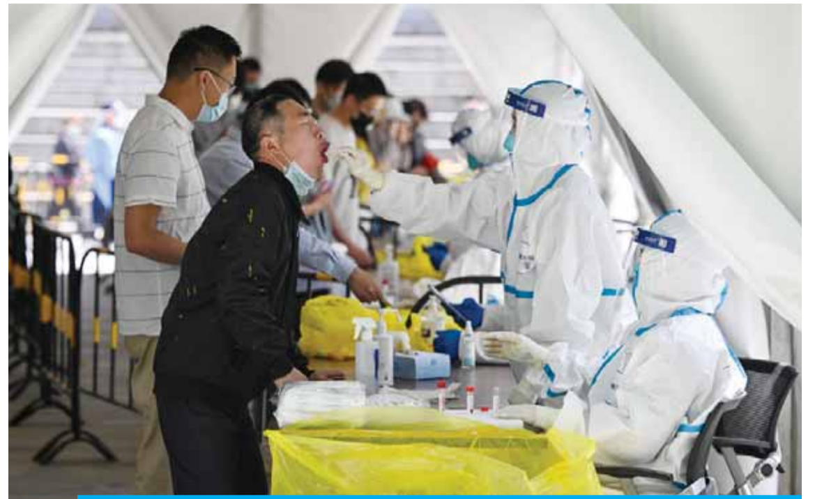
BEIJING: A health worker takes a swab sample from a man to be tested for COVID-19 at a makeshift testing site in Zhongguancun in Beijing.

Authorities have urged residents not to leave