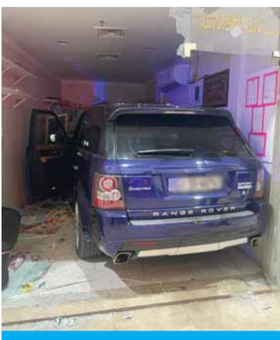
The vehicle that crashed into the printshop.