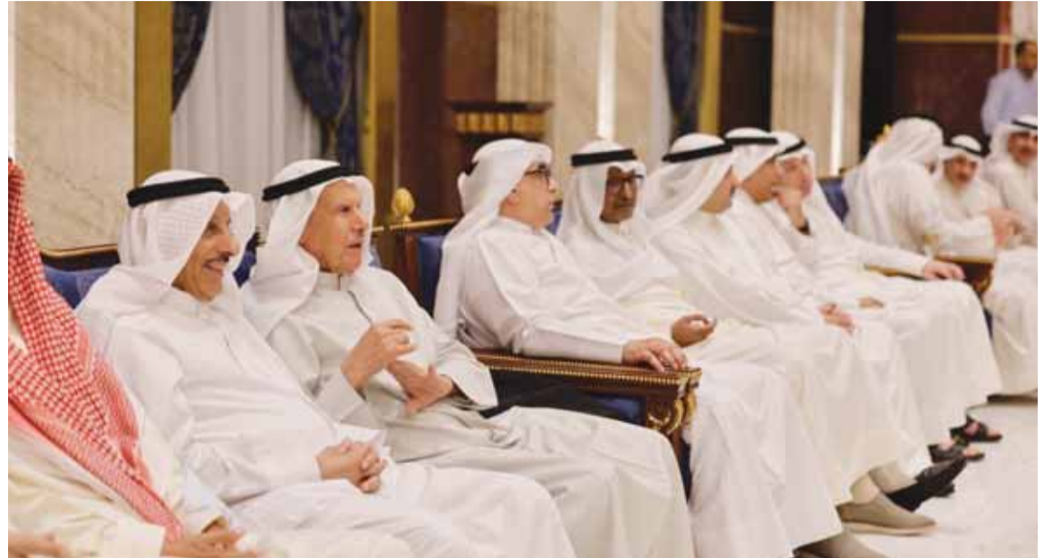
Guests attend the gathering.

KUWAIT: Foreign Minister Sheikh Dr Ahmad Nasser Al-Mohammad Al-Sabah held a 'sohour' banquet late Monday, in honor of the retired ambassadors and officials of the ministry. The minister conveyed greetings and appreciation of His Highness the Amir Sheikh Nawaf Al-Ahmad Al-