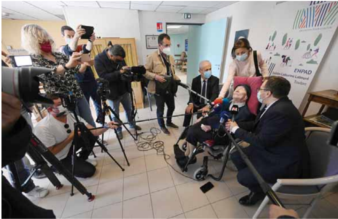
118-year-old French catholic nun Andre Randon speaks to the press at the Saint-Catherine-Laboure nursing home where she lives in Toulon, southern France.