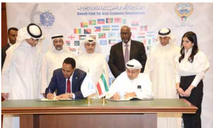
KUWAIT: A picture taken from the ceremony to sign the agreement between Kuwait Fund for Arab Economic Development and the Federal Government of Somalia.

KUWAIT: Kuwait Fund for Arab Economic Development and the Federal Government of Somalia on Tuesday signed a debt relief agreement under the Heavily Indebted Poor Countries Initiative (HIPC) framework. This agreement will allow rescheduling of the arrears and outstanding balance of the eligible loans granted to the Federal Government of Somalia by the Fund and resuming the bilateral relationship between the two parties that had been interrupted by the instability in Somalia period close to thirty years. It is worth mentioning that in the last five years or so, the Federal Government of