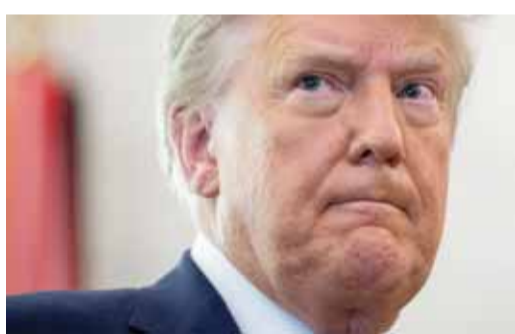
In this file photo US President Donald Trump looks on during a ceremony presenting the Presidential Medal of Freedom to wrestler Dan Gable in the Oval Office of the White House in Washington, DC.