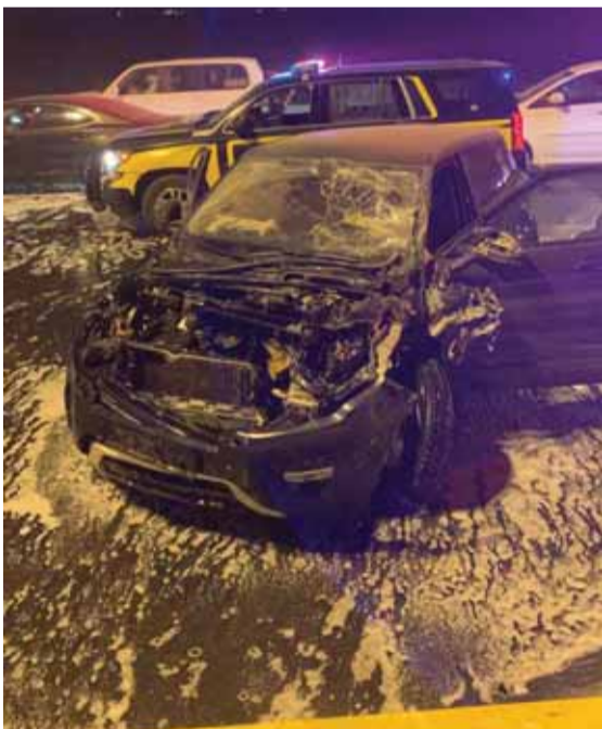
KUWAIT: The vehicle involved in the accident on Wafra Road.

KUWAIT: A two-vehicle collision on Wafra Road resulted in critically injuring a Kuwaiti man and his daughter. Kout firemen freed the two and handed them to paramedics. Meanwhile, a vehicle rammed into the shopfront of a printshop, wounding two expats working there. Both were taken to hospital.