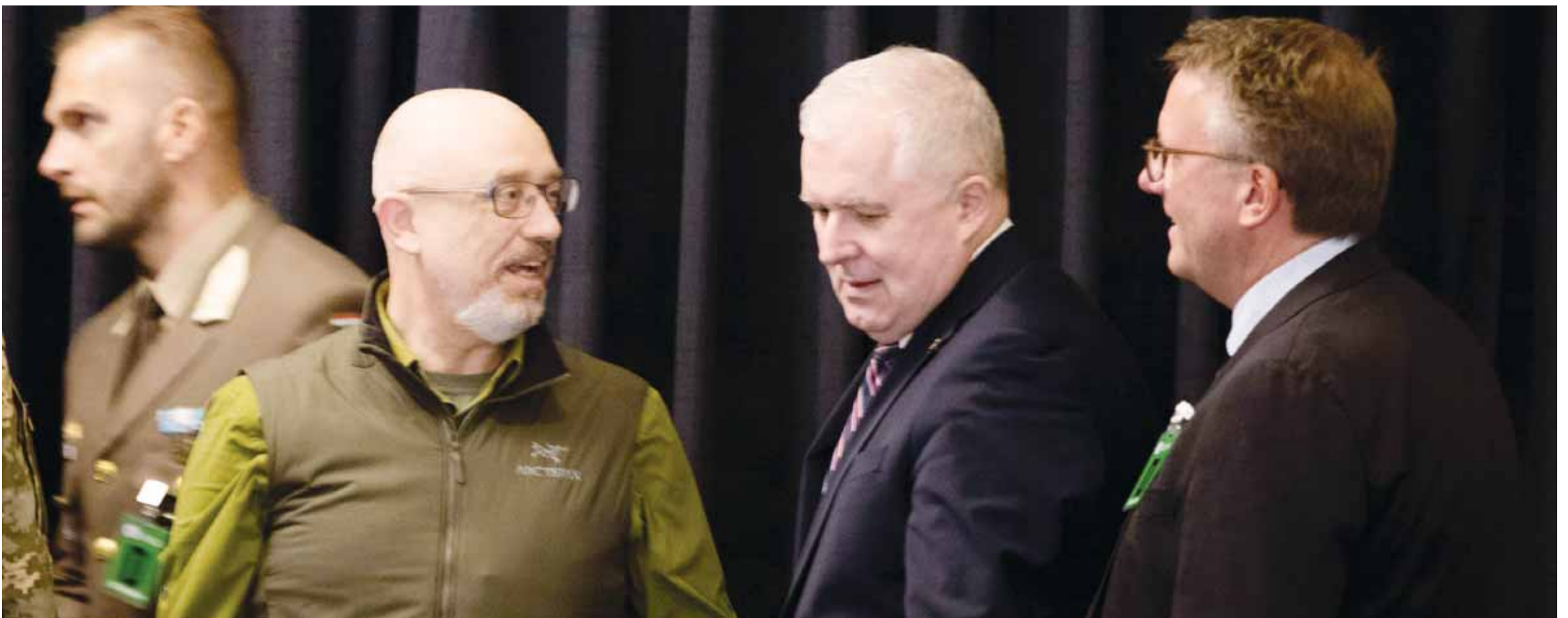
RAMSTEIN AIR BASE: Ukrainian Defense Minister Oleksii Reznikov (3rd right) talks with Lithuania's Minister of Defense Arvydas Anusauskas (2nd right) and Danish Minister of Defense Morten Bodskov (right) as they attend a meeting with members of a Ukraine Security Consultative Group at the US Air Base in Ramstein, western Germany, on April 26, 2022.