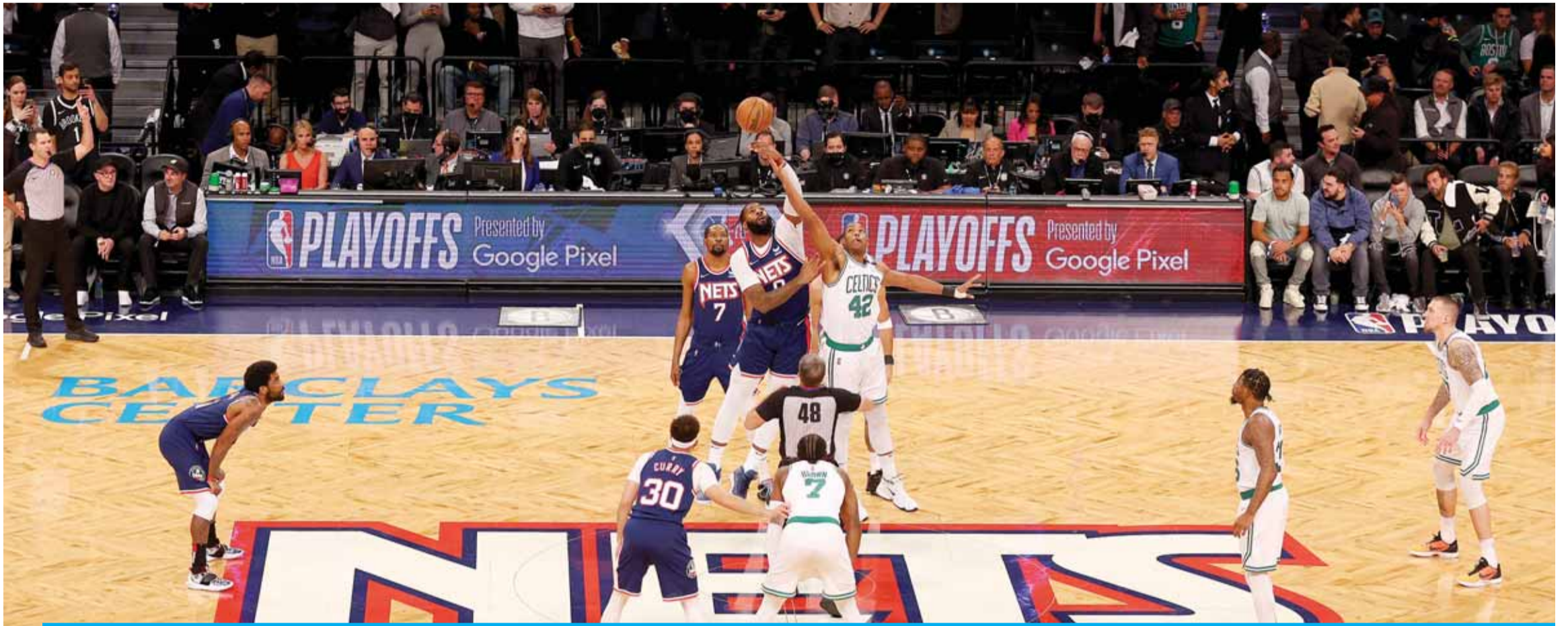
NEW YORK: Andre Drummond #40 of the Brooklyn Nets and Al Horford #42 of the Boston Celtics battle for the opening tipoff to start Game Four of the Eastern Conference First Round Playoffs against the Boston Celtics at Barclays Center on April 25, 2022.