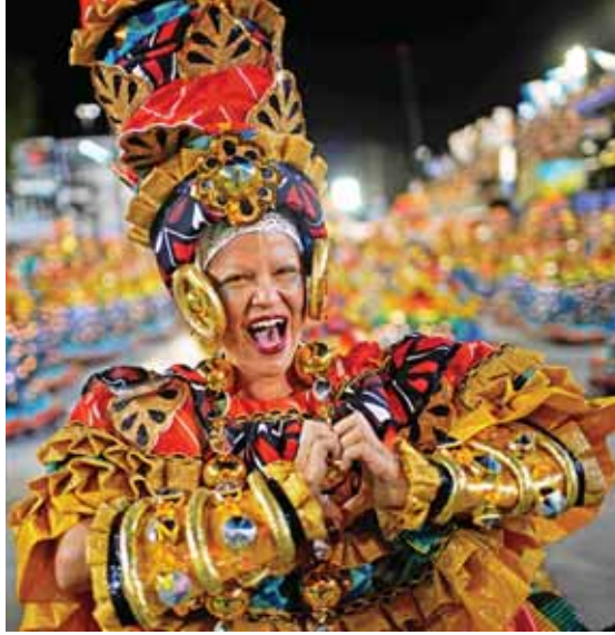
Members of Vila Isabel samba school perform during the second night of Rio's Carnival parade.