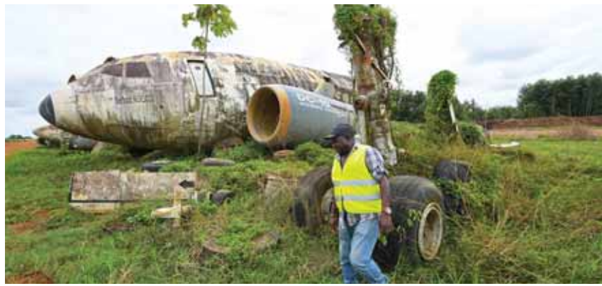
An employee of Aziz Alibhai walks past wreckage of airplanes that are displayed on the edge of a landing strip in Songon Dagbe in the Jacqueville region.