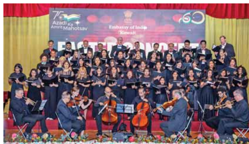
Kuwait Chamber Chorale performs.