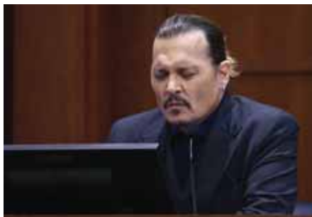
US actor Johnny Depp testifies during the 50 million US dollar Depp vs Heard defamation trial at the Fairfax County Circuit Court in Fairfax, Virginia.

Depp has turned up for the trial in Fairfax County Circuit Court with his hair tied back in a ponytail, earrings and chunky rings. He has favored three-piece suits in court and wore an all-black ensemble on Thursday—black suit, black vest, black shirt and black tie. The Texas-