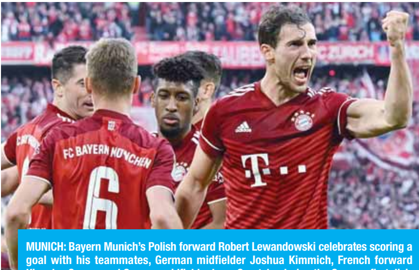
MUNICH: Bayern Munich's Polish forward Robert Lewandowski celebrates scoring a goal with his teammates, German midfielder Joshua Kimmich, French forward Kingsley Coman and German midfielder Leon Goretzka during the German first division Bundesliga match against Borussia Dortmund on April 23, 2022.

Dortmund responded early in the second half as Can converted a penalty after Marco Reus was brought down in the area. The visitors had their appeals for another spot-kick waved