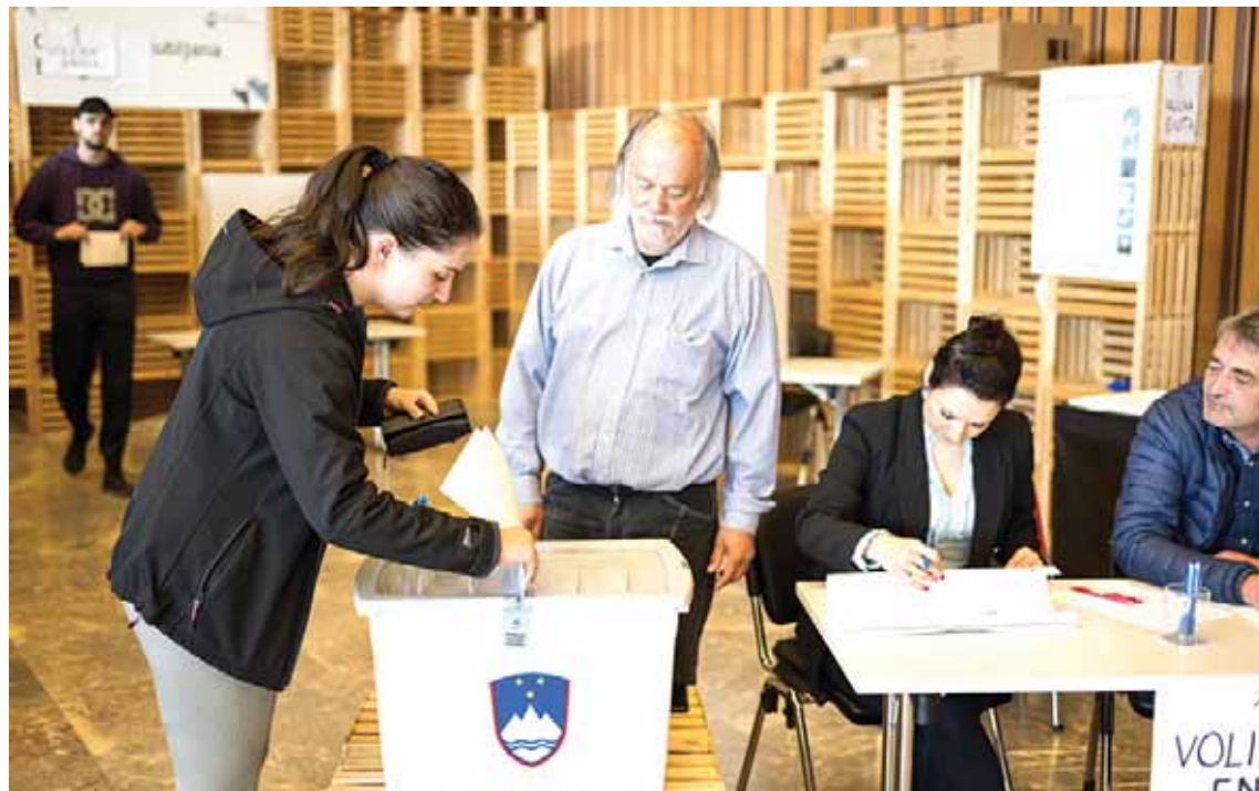
LJUBLJANA, Slovenia: A woman casts her ballot at a polling station during a general election in Ljubljana on April 24, 2022.