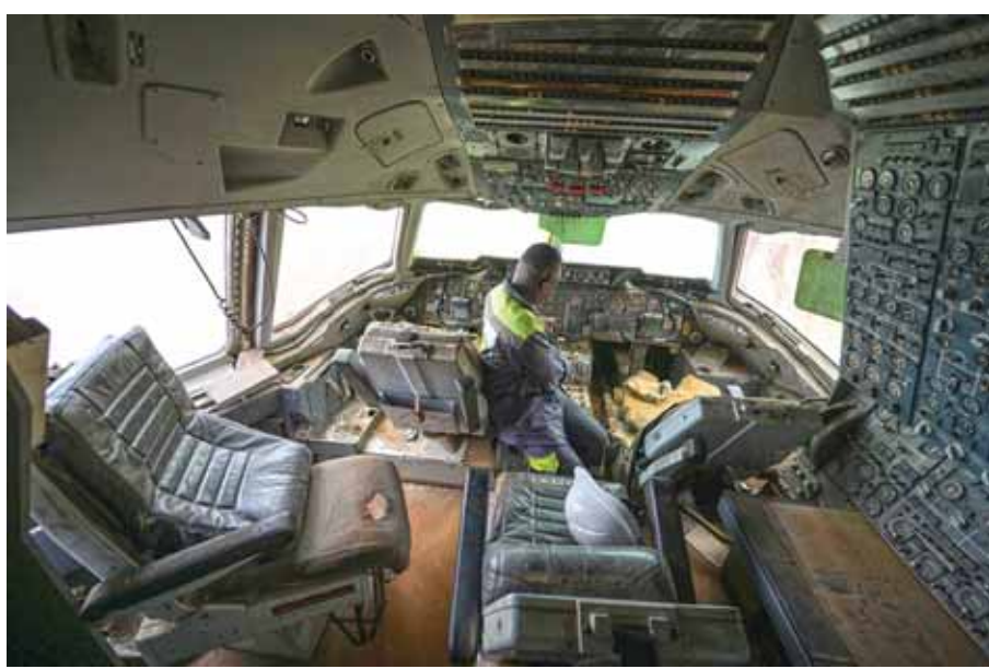
An employee of Aziz Alibhai is seen in the wreckage of a cockpit in a DC-10 aircraft that is displayed on the edge of a landing strip.

stay of the former Soviet Union as a military transport and cargo hauler for almost three decades, remains sliced in two parts, which border a football field. Alibhai envisages a terrace connecting the two giant sections, where visitors can have a drink. Seats have been stripped out of most of the planes and today accommodate spectators on the stands of the Ivoire Academie grounds. Some first-class seats are being used on Alibhai’s terrace, where he invites visitors to have a cocktail.