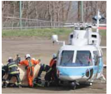
Japan finds four from missing boat