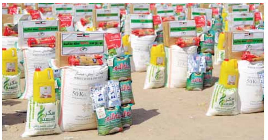
MARIB: Displaced Yemenis receive food aid donated by a Kuwaiti charitable organization, on the outskirts of the northeastern city of Marib, on April 23, 2022.