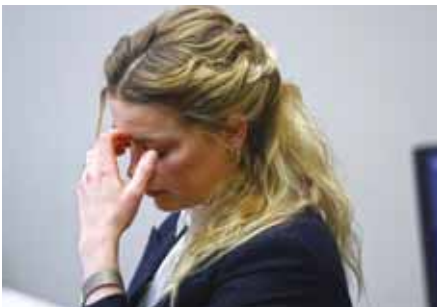
US actress Amber Heard reacts as she listens to an audio recording of she and US actor Johnny Depp.

There have been enough references to celebrities during the trial’s first week to fill a tabloid. Depp said he suspected the actor James Franco was having an affair with Heard. Heard, for her part, was jealous about a tattoo Depp had that read “Winona Forever”—a reference to former girlfriend Winona Ryder.