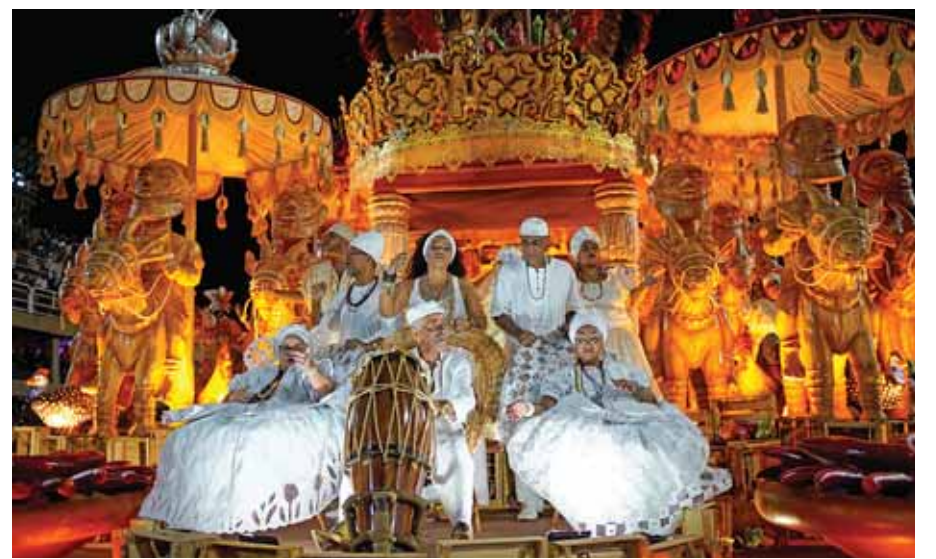
Members of Grande Rio samba school perform during the second night of Rio's Carnival parade.

Each group in the competition has 60 to 70 minutes to tell a story in music and dance, evaluated on nine criteria by the jury. The reigning champions, Viradouro, paid tribute to Rio's epic 1919 carnival-the first celebrated after the devastation of another pandemic, the Spanish flu. "No sadness can withstand so much joy," goes their samba theme song. "It's a love