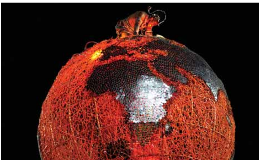
Members of Grande Rio samba school perform during the second night of Rio's Carnival parade.