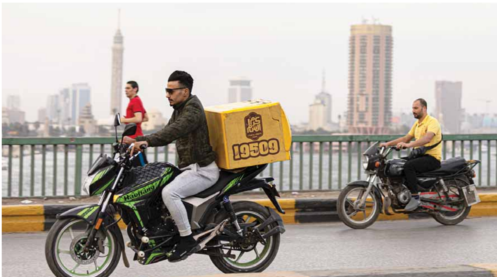
CAIRO: A delivery worker rides his motorbike in the Egyptian capital Cairo during the holy month of Ramadan.

A third of Egyptians live in poverty, and nearly the same number are vulnerable to falling into poverty, the World Bank says. The average family’s monthly income is 6,000 EGP ($325). Following the strike this month, Talabat said in a statement that couriers earned around