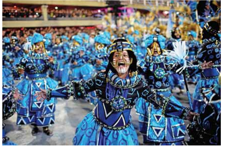
Members of Vila Isabel samba school perform during the second night of Rio's Carnival parade at the Sambadrome Marques de Sapucaí in Rio de Janeiro.