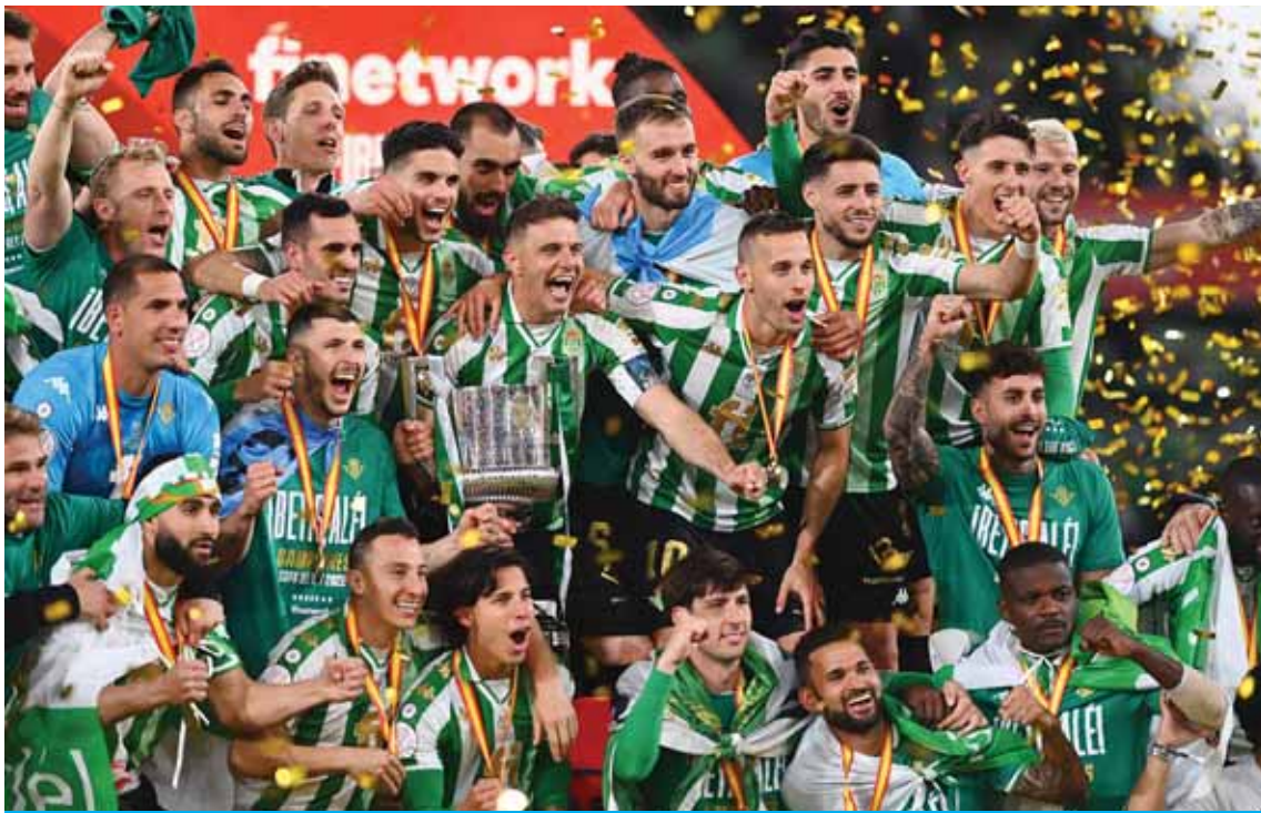
SEVILLE: Real Betis players celebrate their victory after winning the Spanish Copa del Rey final against Valencia at La Cartuja Stadium on April 23, 2022.