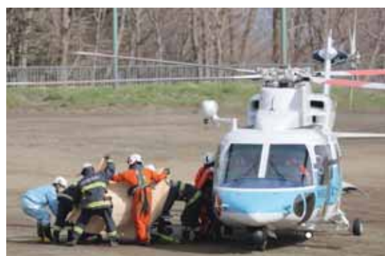
SHARI, Japan: Rescue personnel hold up material to shield a stretcher from media, as they make a transfer from a helicopter to a waiting ambulance at a schoolfield in Shari, Okhotsk Subprefecture of Hokkaido on April 24, 2022.

Japan's coastguard has been involved in a variety of search and rescue missions around the archi-