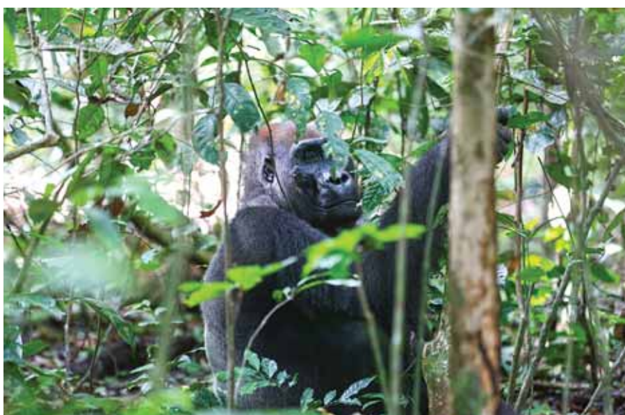
A silverback gorilla picks leaves to eat in Loango National Park. — AFP

During an initial habituation phase, gorillas are afraid of humans and run away when approached. In the next phase, they stop fleeing but may react with aggressive charges. In the final phase, they react calmly and continue their activities without concern about the human presence. Today, Gabon is counting on the gorillas to attract new visitors. There are two family groups in the country accustomed to humans, one in Loango, the other in the Moukalaba Doudou National Park 600 kilometers (370 miles) south of Libreville. However, tourist infrastructure is still almost nonexistent. —AFP