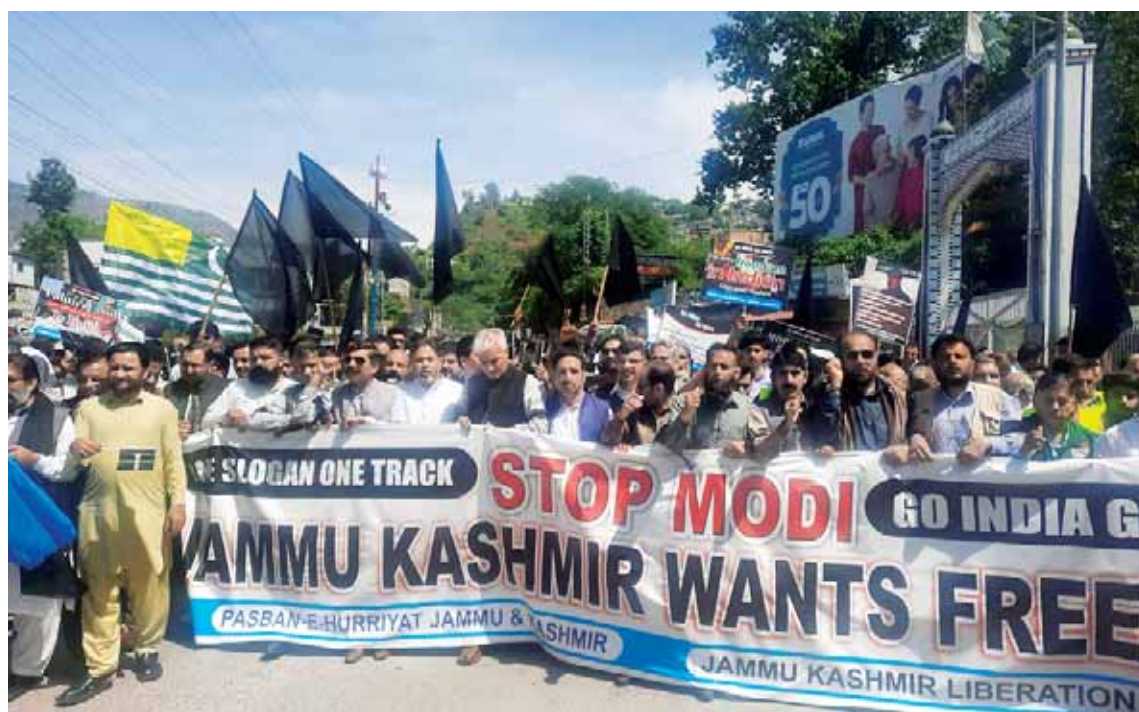
MUZAFFARABAD, Pakistan: Pakistani Kashmiri protesters take part in a demonstration in Muzaaffarabad on April 24, 2022, against the visit of India's Prime Minister Narendra Modi to the Jammu and Kashmir.

Young men continue to join rebel groups that have fought Indian rule of Kashmir for more than three decades. Militants threw grenades at a bus carrying security forces on Friday, killing an officer, in an incident around 20 kilometres (12 miles) from the venue of Modi's public appearance. Two suspected rebels were killed in the ensuing fire-fight with security forces.