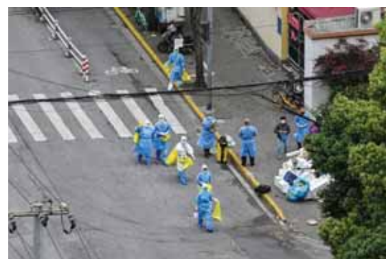
SHANGHAI, China: Health workers (C) walk along a street past a group of neighbourhood residents (R) waiting for a bus during the COVID-19 lockdown in the Jing'an district in Shanghai on April 24, 2022.

Authorities ordered people to stay out of a two-kilometre exclusion zone around the volcano, which is currently graded at level two of Indonesia's four-tiered volcanic alert system. “People, including tourists, should adhere to the recommendation from the Geological Agency, which prohibits anyone to be within a two-kilometre radius from the