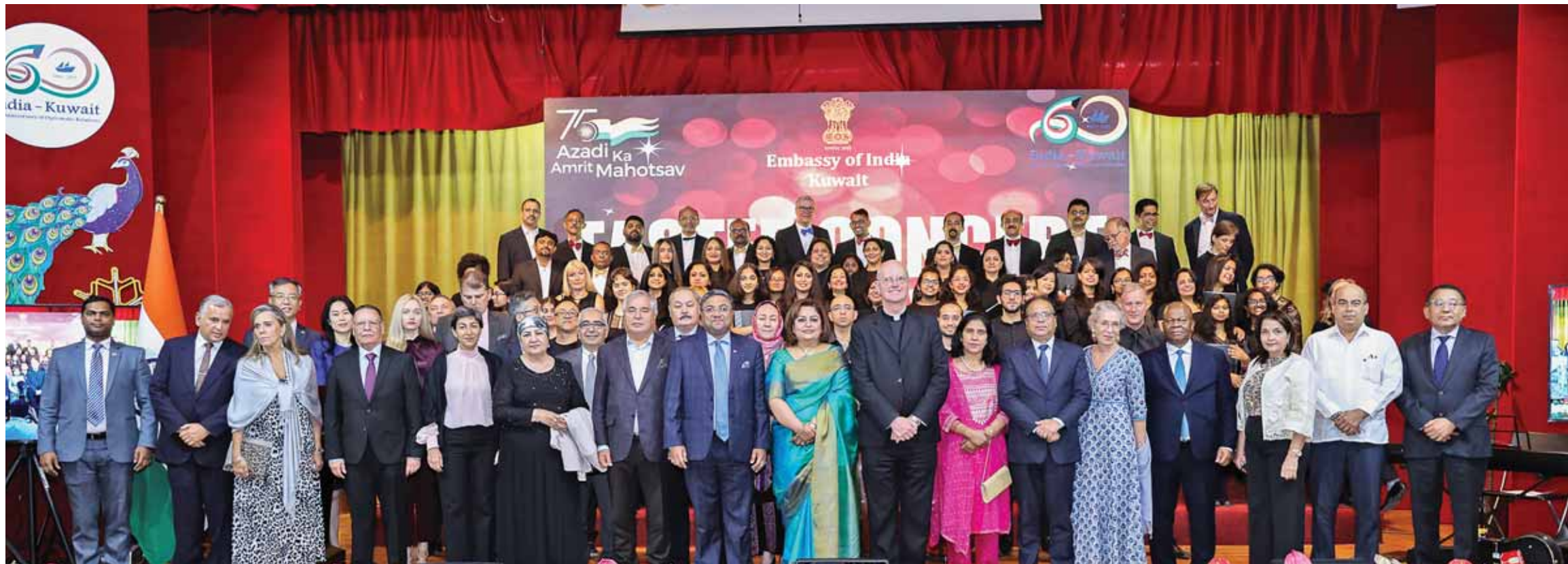
Indian Ambassador Sibi George poses for a group photo with the dignitaries and members of the Kuwait Chamber Chorale.