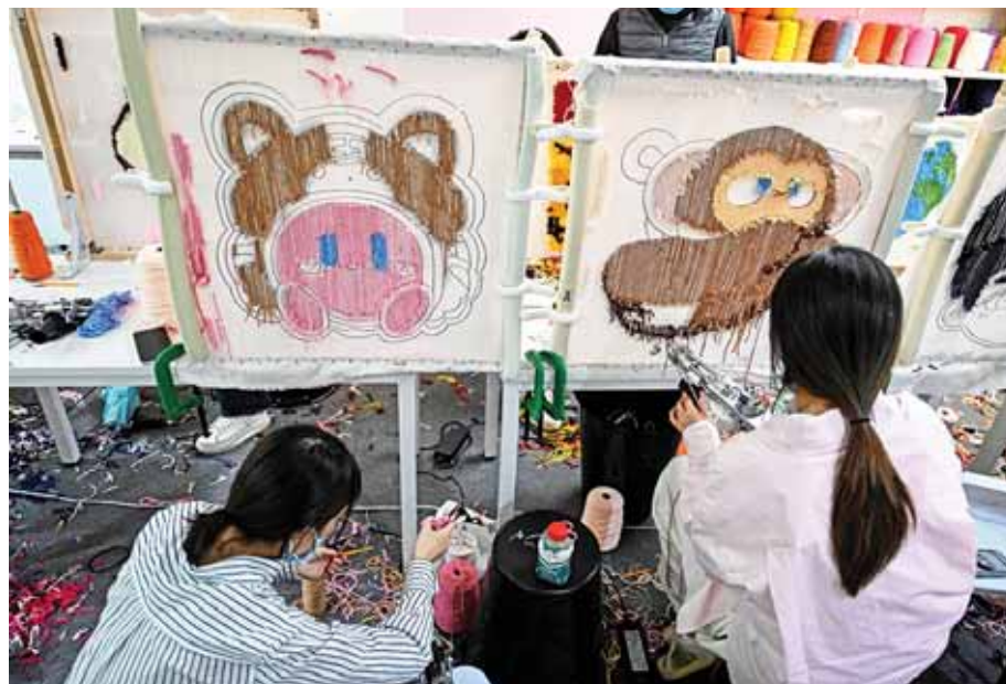
These photos show participants using craft guns to make mats and rugs at a tufting workshop in Beijing.