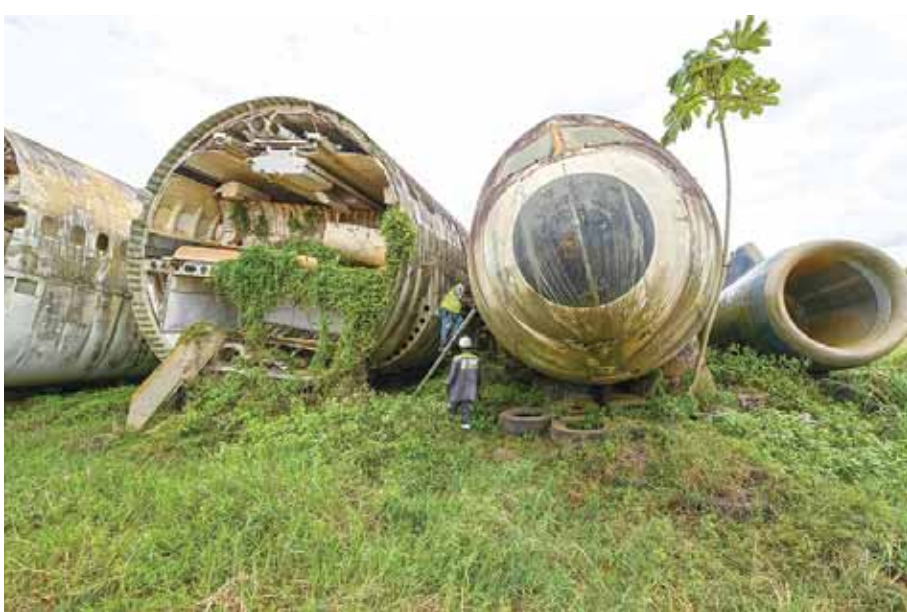
An employee of Aziz Alibhai climbs into the wreckage of an airplane that is displayed on the edge of a landing strip.

Eleven disused planes were hauled to the vast site of his construction machinery rental company—it also houses the facilities of Ivoire Academie, a third division football club of which Alibhai is the president. Eight of the aircraft are lined up on an 800-metre (-yard) airstrip that leads to the placid lagoon. “Some planes had to be cut into two or three sections to be able to transport them without blocking the whole road,” he recalled.