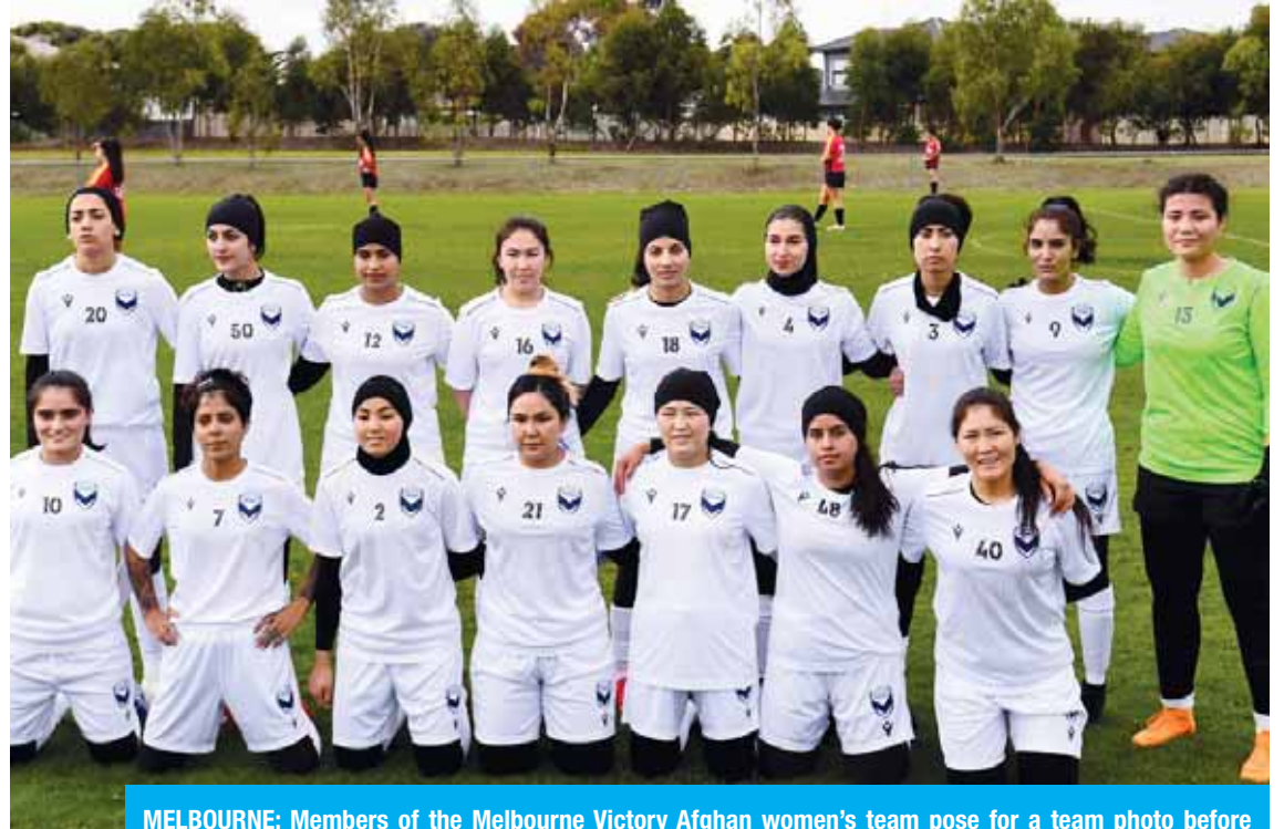
MELBOURNE: Members of the Melbourne Victory Afghan women's team pose for a team photo before their first match in a local league against ETA Buffalo SC on April 24, 2022. —AFP

A few days ahead of Sunday's match, Melbourne Victory presented the Afghan Women's Team with their new predominantly red kit, complete with shirts showing off the Afghan national flag. The shirts are marked with numbers but no names for the safety of players' families in Afghanistan. —AFP