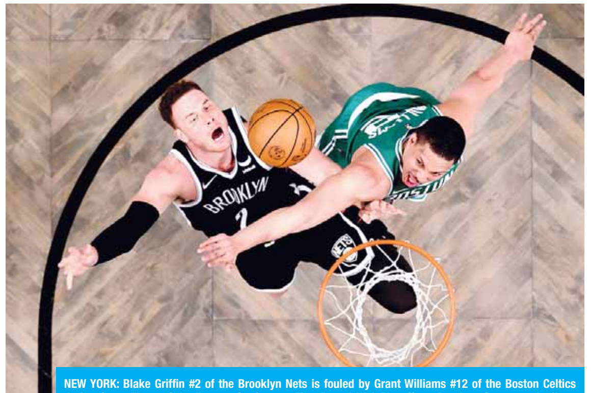
NEW YORK: Blake Griffin #2 of the Brooklyn Nets is fouled by Grant Williams #12 of the Boston Celtics during Game Three of the Eastern Conference First Round NBA Playoffs at Barclays Center on April 23, 2022.

In Toronto, forward Pascal Siakam scored a playoff career-high 34 points and Gary Trent Jr. added 24 in the Raptors' 110-102 triumph over the Philadelphia 76ers to cut the deficit in their series to 3-1. The Sixers can still advance in the best-of-