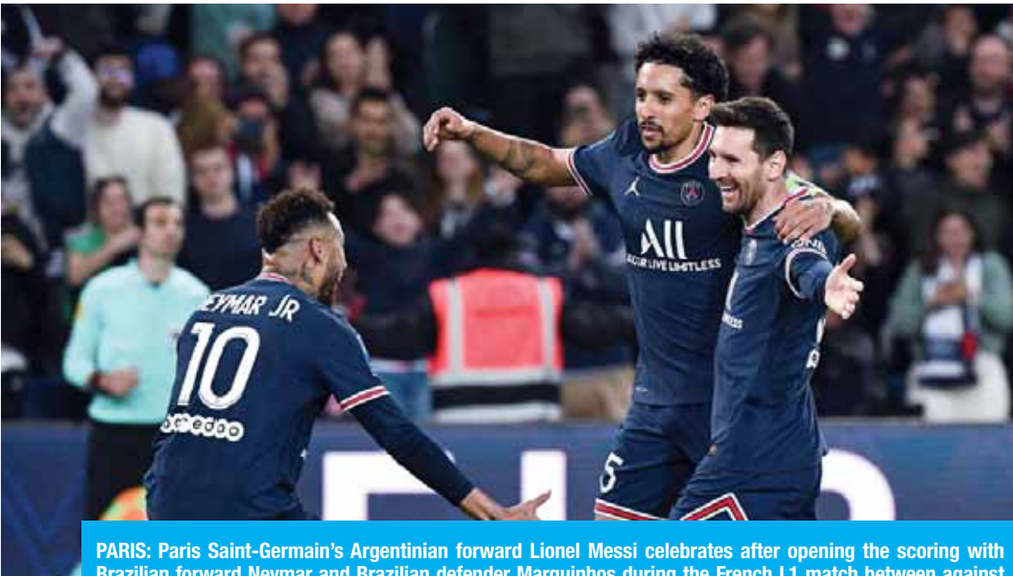
PARIS: Paris Saint-Germain's Argentinian forward Lionel Messi celebrates after opening the scoring with Brazilian forward Neymar and Brazilian defender Marquinhos during the French L1 match between against Lens at The Parc des Princes Stadium on April 23, 2022.

European hopefuls Lens pushed for a winner which would have kept PSG waiting for at least another 24 hours, but the home side held on and