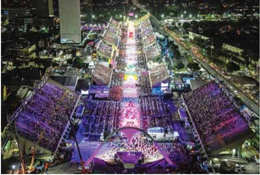
Handout picture released by Rio de Janeiro's City Hall press office of Estacao Primeira de Manguera samba school parade during the first night of carnival at the Marques de Sapucaí Sambadrome in Rio de Janeiro, Brazil. — AFP photos