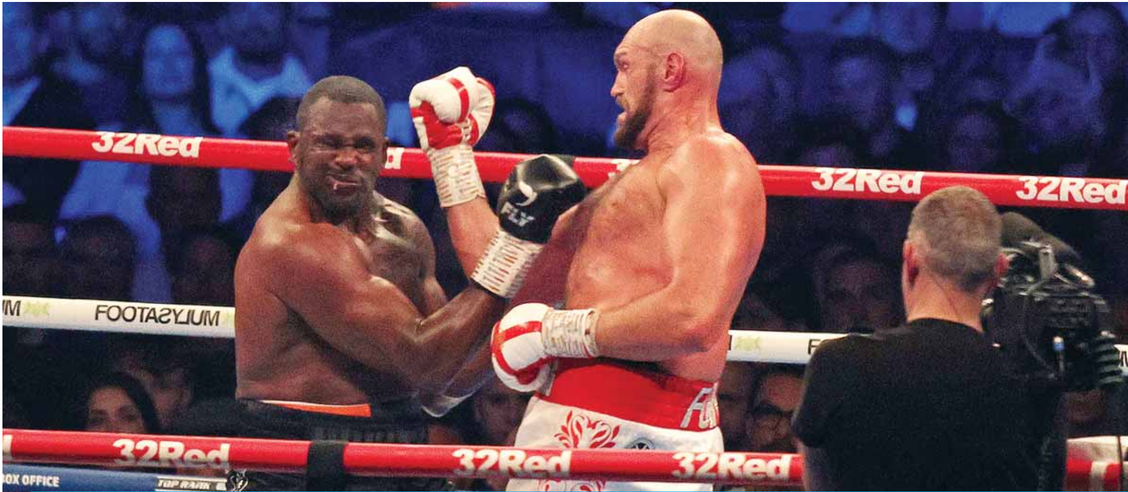
LONDON: Britain's Tyson Fury lands a punch to knock out Britain's Dillian Whyte in the sixth round and win their WBC heavyweight title fight at Wembley Stadium on April 23, 2022.