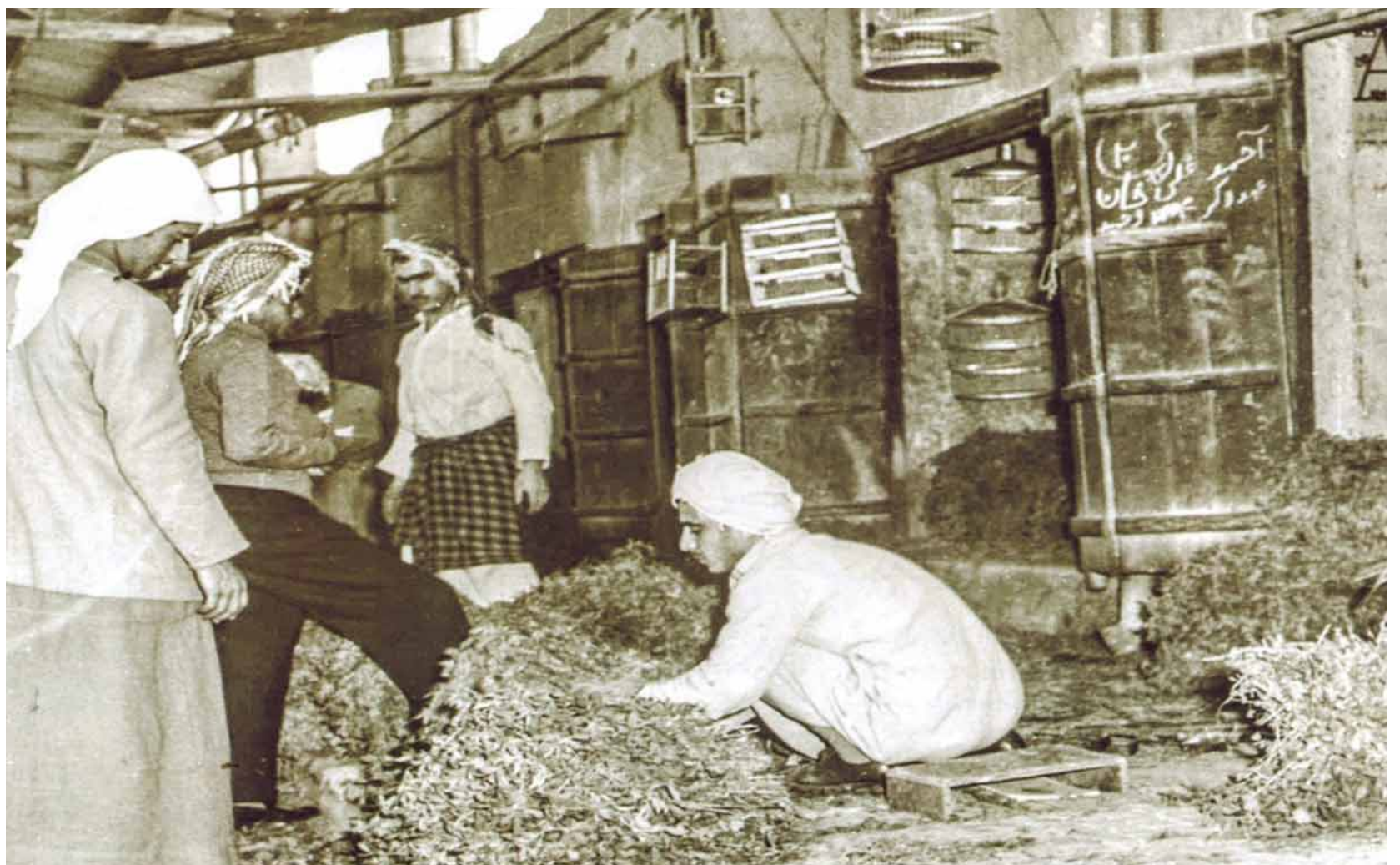
KUWAIT: A picture dated to the early 1960s shows Al-Falfa market which sold animal feed that was imported from Basra.