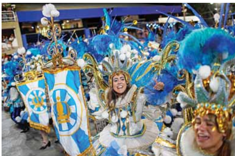
Members of Vila Isabel samba school perform during the second night of Rio's Carnival parade at the Sambadrome Marques de Sapucaí in Rio de Janeiro.