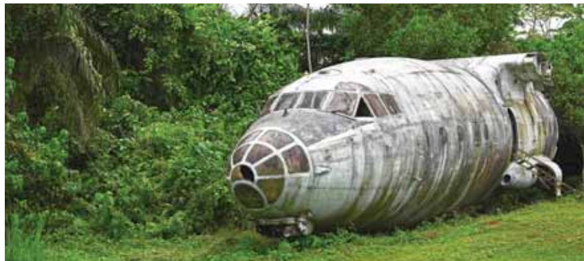
A general view of a wrecked Antonov military aircraft that is displayed.