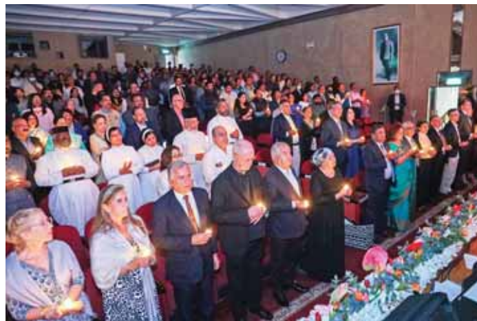
Candle light vigil.