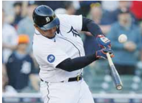
DETROIT: Miguel Cabrera #24 of the Detroit Tigers singles against the Colorado Rockies during the first inning of Game Two of a doubleheader at Comerica Park on April 23, 2022.

Only three other active players - Robinson Cano, Yadier Molina and Joey Votto - have as many as 2,000. Cabrera had put himself on the brink of 3,000 with singles in his first three at-bats on Wednesday in the Tigers' 5-3 loss to the New York Yankees. He was 0-for-3 at the plate with an intentional walk in Thursday's 3-0 victory over New York. Cabrera entered MLB in 2003, joining the then-Florida Marlins and winning a World Series title with them before signing for the Tigers in 2008. As the 3,000-hit milestone approached he has shied away from talking about it, preferring to focus on the team's goals. But Tigers manager A J Hinch said this week he has urged Cabrera's younger teammates to take notice of what they are seeing.