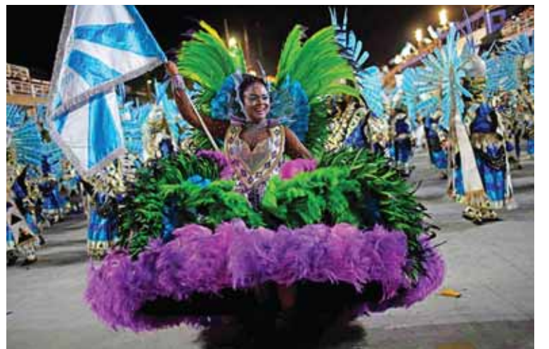
Members of Grande Rio samba school perform during the second night of Rio's Carnival parade.