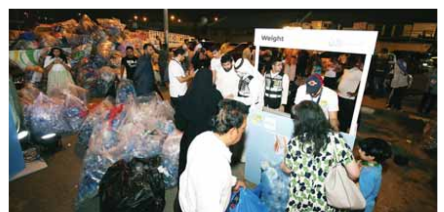
KUWAIT: The Environment Public Authority (EPA) hosted a competition to collect plastic for recycling on Earth Day. The first-place winner won a KD 500 grand prize after collecting 350 kilograms of plastic.