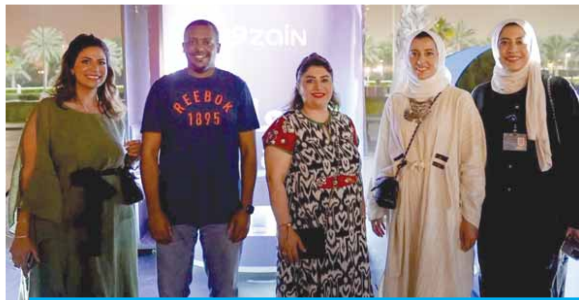
KUWAIT: Zain's team during the event.

Zain's Corporate Sustainability and Social Responsibility campaign during the holy month of Ramadan includes an extensive array of programs that covers different areas. The initiatives and programs include humanitarian, voluntary, cultural, religious, sports, and recreational programs.