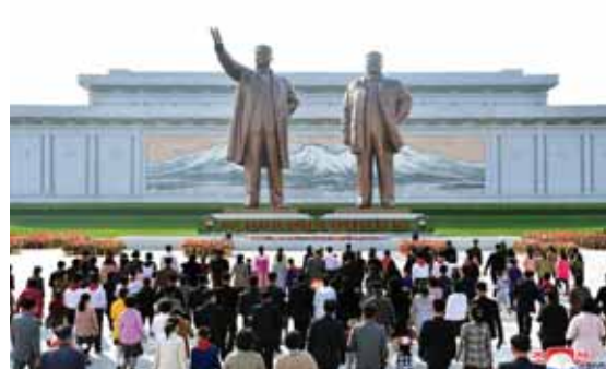
PYONGYANG, North Korea: File picture shows citizens offering flowers to the bronze statues of former leaders Kim Il Sung and Kim Jong Il on the Day of the Sun, the 110th birth anniversary of late North Korean leader Kim Il Sung, in Pyongyang. —AFP

In September 2020, a cargo ship with 43 crew onboard sunk after being caught in a typhoon off Japan's southwest coast. Two survivors were rescued, while a third crew member was found unresponsive and declared dead. The search operation was called off a week later. —AFP