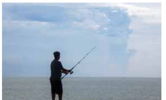
ANYER, Indonesia: A man fishes at Pasauran beach, Anyer in Serang on April 24, 2022 while Mount Anak Krakatau spews thick smoke into the air. —AFP

The worst pipeline blast in Nigeria happened in southern town of Jesse in October 1998, leaving over 1,000 villagers dead. The government has deployed the military to raid and destroy illegal refineries in the Niger delta as part of measures to stop stealing. —AFP