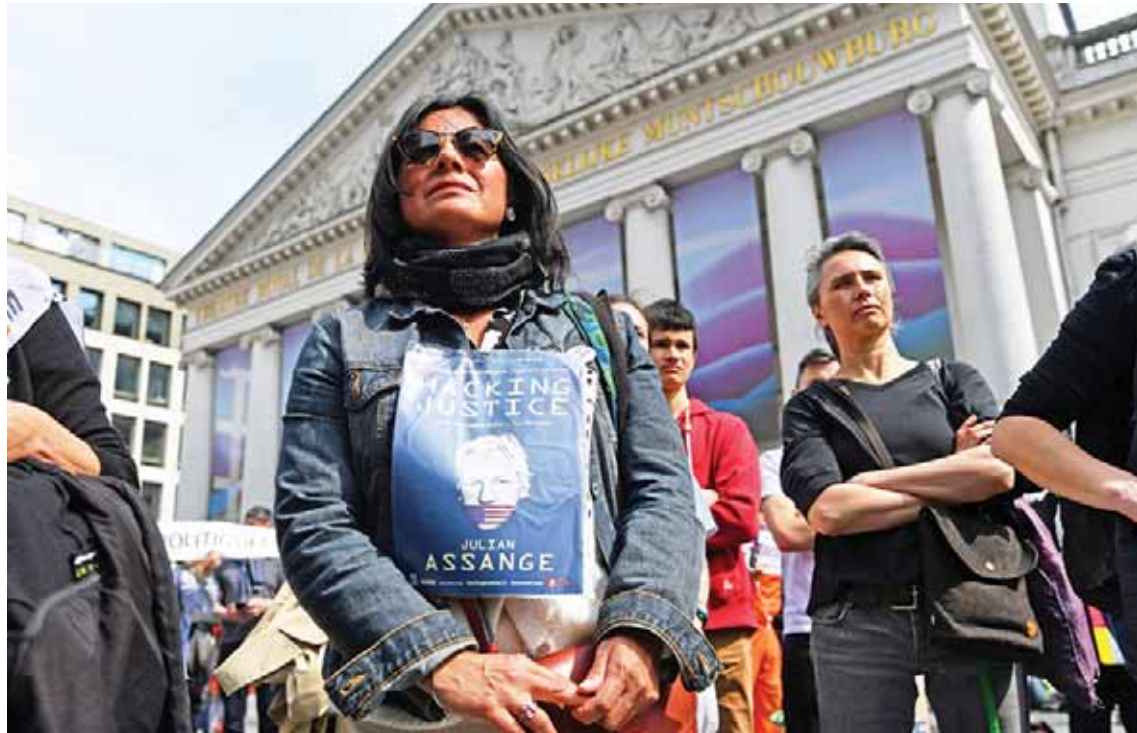
BRUSSELS, Belgium: People take part in a demonstration in support of Wikileaks founder Julian Assange who is facing extradition to the USA in Brussels.

"It is the soul of European values-of democratic values-that is at stake," she added. "Julian has been in Belmarsh prison now for three years. He is in an increasingly weakened state of health. He had a mini-stroke in October." The British government "is condemning war crimes in Ukraine, but it is going to show whether it is prepared to extradite a journalist for having exposed war crimes", she said.