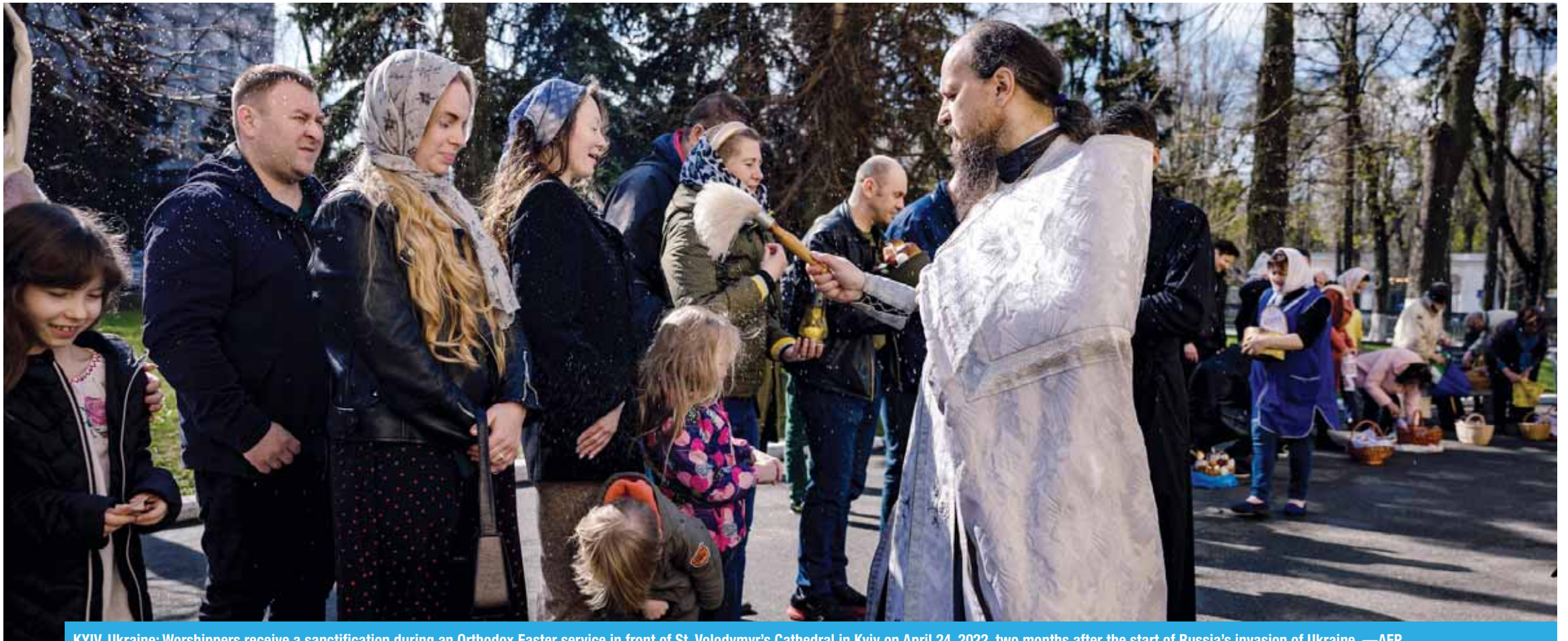
KYIV, Ukraine: Worshippers receive a sanctification during an Orthodox Easter service in front of St. Volodymyr's Cathedral in Kyiv on April 24, 2022, two months after the start of Russia's invasion of Ukraine.