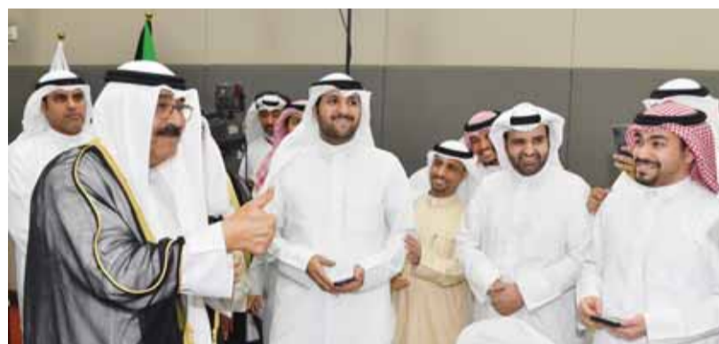
KUWAIT: His Highness the Crown Prince Sheikh Mishal Al-Ahmad Al-Jaber Al-Sabah uses sign language to communicate during his visit to Kuwait Sports Club for the Deaf.