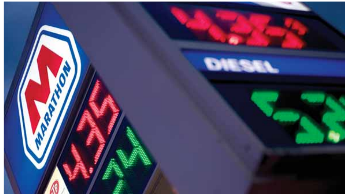
WASHINGTON: In this file photo taken on March 31, 2022, signs display the price of gas at a Marathon gas station in Washington, DC.

Russian finance officials are expected to participate remotely in the G20 meeting on Wednesday, which is led by Indonesia this year. Other officials