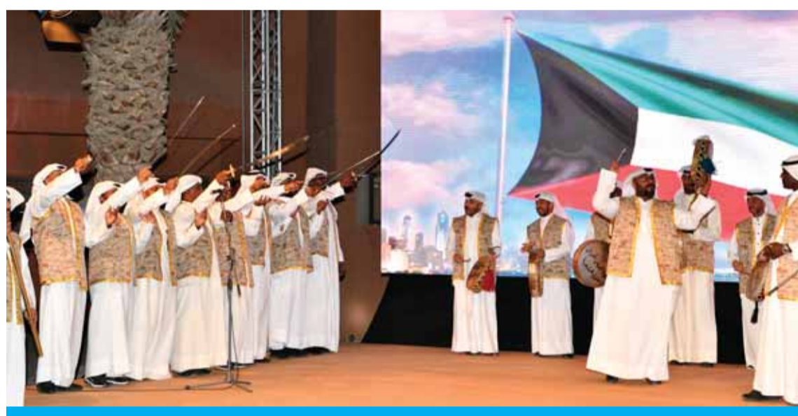
A traditional Ardha dance performed during His Highness the Crown Prince Sheikh Mishal Al-Ahmad Al-Jaber Al-Sabah's visit.