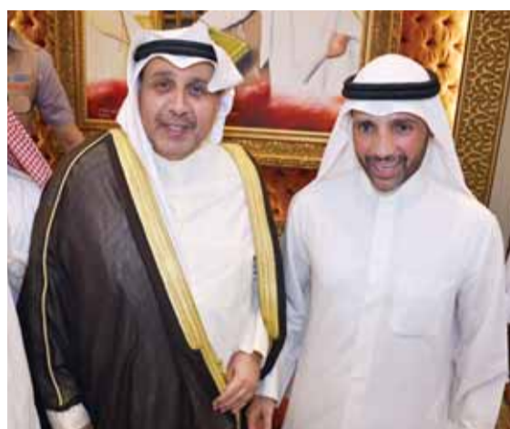
Marzouq Al-Ghanem with former minister Hamad Jaber Al-Ali Al-Sabah.

KUWAIT: National Assembly Speaker Marzouq Ali Al-Ghanem said he will remain the representative of people's will and steadfast in the defense of Kuwait's security and stability. Ghanem thanked all those who attended the ghabqa he held at Ali Al-Ghanem Diwan in Abdullah Al-Salem. "I cannot express my feelings and gratitude for the generosity Kuwait's people have afforded me on every occasion," he said.