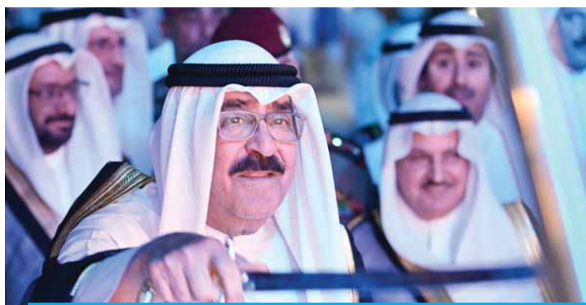
KUWAIT: His Highness the Crown Prince Sheikh Mishal Al-Ahmad Al-Jaber Al-Sabah performs the traditional Ardha dance.