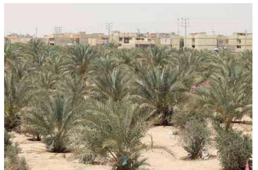
KARBALA: Picture shows a view of a palm and olive grove in the 'green belt' area of Iraq's central city of Karbala.