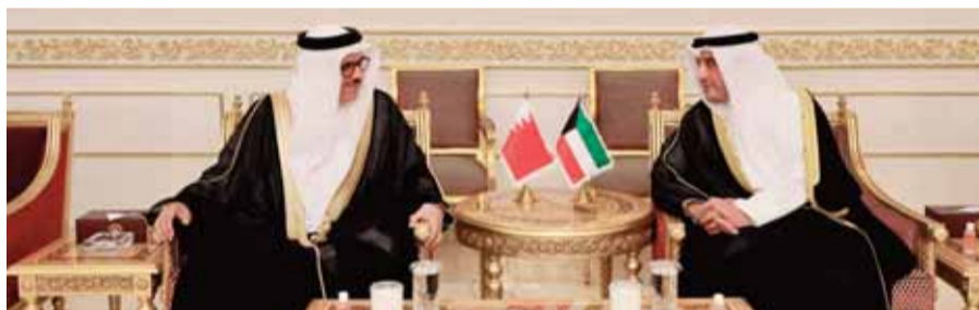
KUWAIT: Kuwait's Foreign Minister Sheikh Dr Ahmad Naser Al-Mohammad Al-Sabah meets his Bahraini counterpart Foreign Minister Abdullatif Al-Zayani. —KUNA

KUWAIT: Kuwait's Foreign Minister Sheikh Dr Ahmad Naser Al-Mohammad Al-Sabah met on Monday with Bahraini counterpart Foreign Minister Abdullatif Al-Zayani and his accompanying delegation, on his formal visit to Kuwait. The meeting revolved around issues that concern both nations and its citizens and ways of strengthening these affairs in all fields, as well as discussing domestic and global developments. —KUNA