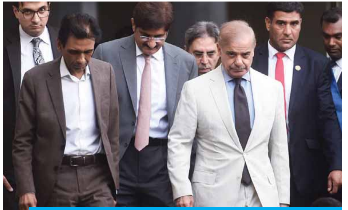
LAHORE: Pakistan's Prime Minister Shehbaz Sharif (2R) and leader of the Muttahida Qaumi Movement (MQM-P) and coalition partners of the newly formed government Khalid Maqbool Siddiqui (L) leave after a meeting in Karachi.

He was arrested on drug charges in July 2019