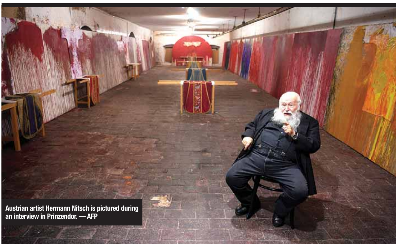
Austrian artist Hermann Nitsch is pictured during an interview in Prinzendorf.