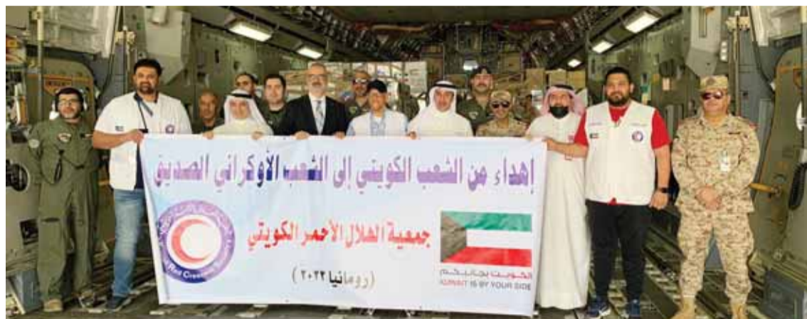
KUWAIT: Officials pose for a group photo before a plane carrying aid to Ukrainian refugees left Kuwait yesterday.