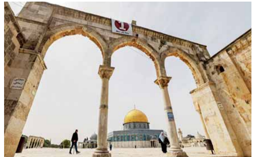
JERUSALEM: A general view shows the Dome of Rock mosque in Jerusalem's flashpoint Al-Aqsa Mosque compound.