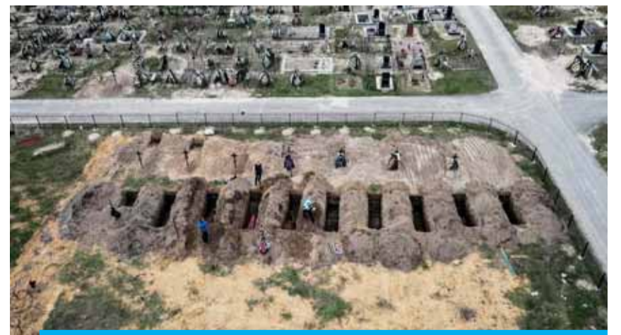
BUCHA: An aerial picture taken shows coffins being buried during a funeral ceremony at a cemetery in Bucha, Ukraine, amid the Russian invasion.