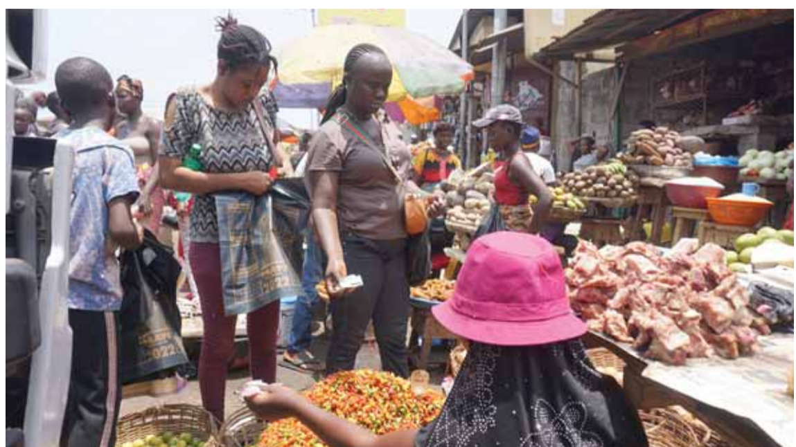
FREETOWN, Sierra Leone: A woman buys items from a trader at a market in Freetown as prices for basic commodities has hiked in Sierra Leone since COVID-19 pandemic and the invasion of Ukraine by Russia. —AFP

"On this wall of opacity, the efforts of the countries that want to sanction these are now stumbling," it added. With populations suffering from the impact of the COVID-19 pandemic, "Russia's invasion of Ukraine has aggravated this already-worrisome context," with rising prices and insecurity, it added. "We now have a unique opportunity to make progress on the implementation of a global asset registry" to cut through the web of front-companies and link all kinds of assets to their true owners. —AFP