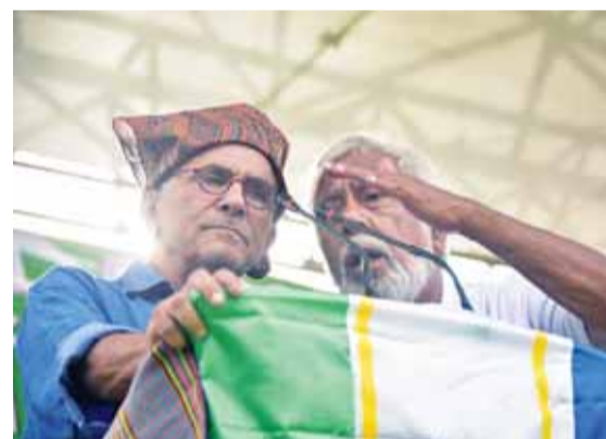
DILI: East Timor's presidential candidate Jose Ramos-Horta (L) and the country's first president Xanana Gusmao (R) attending an election campaign in Dili.

Since the coup, many of her political allies have been arrested, with one chief minister sentenced to 75 years in jail. Others have gone into hiding. Under a previous junta regime, Suu Kyi spent long periods under house arrest in her family mansion in Yangon.