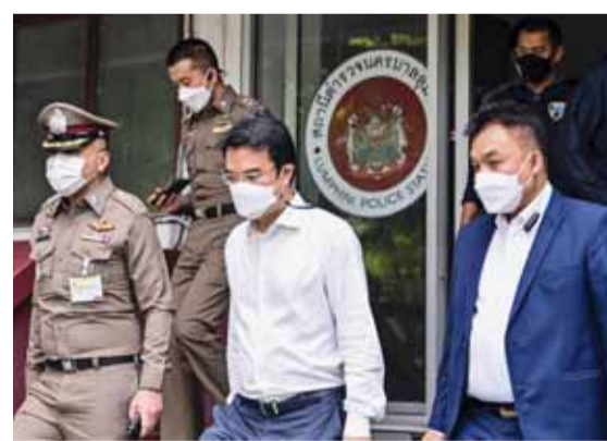
BANGKOK: Photo shows Prinn Panitchpakdi (C), a former deputy of Thailand's Democrat Party, as he leaves a police station in Bangkok on his way to court to ask for bail. —AFP

"During the COVID-19 pandemic, students faced a difficult situation because their classes were moved online, and it did not go well because of the bad internet," de Araujo said, adding jobs for the country's young were also a pressing concern. According to the World Bank, 42 percent of the population lives in poverty. —AFP