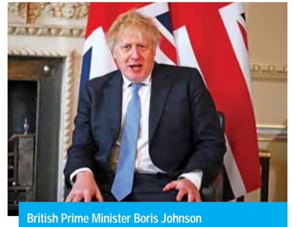
British Prime Minister Boris Johnson

Commons Speaker Lindsay Hoyle is said to be considering whether to allow such a vote, amid pressure from opposition parties. But government minister Brandon Lewis defended Johnson, telling Sky News on