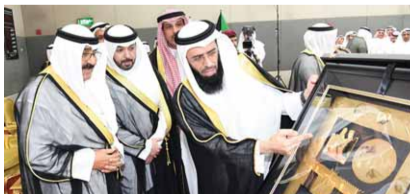
KUWAIT: His Highness the Crown Prince Sheikh Mishal Al-Ahmad Al-Jaber Al-Sabah receives a souvenir during his visit.