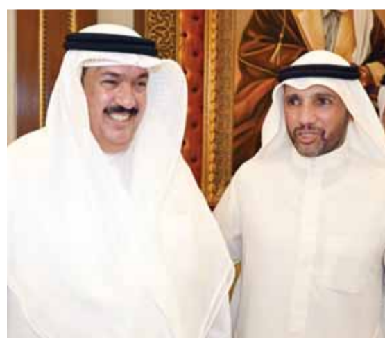
Marzouq Al-Ghanem with Minister of Education Ali Al-Mudhaf.