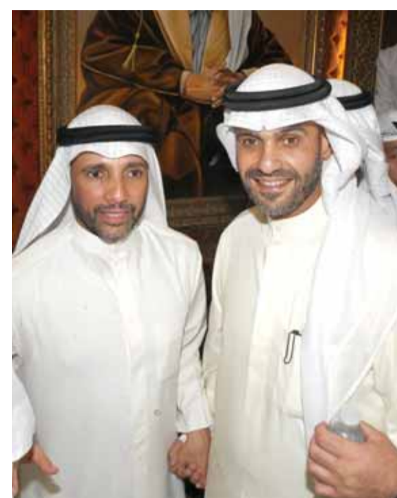
Marzouq Al-Ghanem with former minister Anas Al-Saleh.