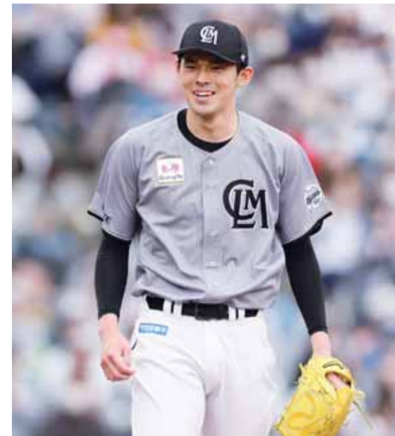
CHIBA, Japan: This picture taken on April 17, 2022, shows Lotte Marines pitcher Roki Sasaki smiling during the Nippon Professional Baseball (NPB) match between the Chiba Lotte Marines and Hokkaido Nippon Ham Fighters at ZOZO Marine Stadium.

The decision may have disappointed some of the 30,000 fans that filled Zozo Marine Stadium, and the team ended up losing 1-0, but Sasaki said he understood Iguchi's call. "The control and the quality of my pitches were a bit off compared with the last time, but I managed to get through," he told local media. "I was getting a bit tired."