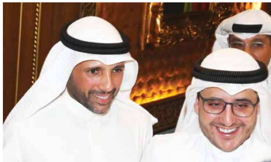
Marzouq Al-Ghanem with Foreign Minister Sheikh Ahmad Nasser Al-Mohammad Al-Sabah.