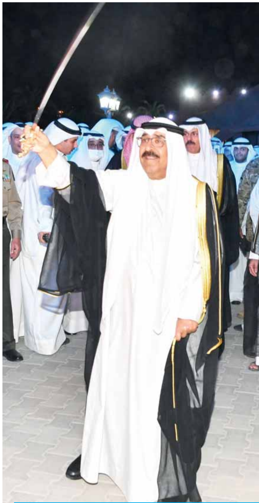
His Highness the Crown Prince Sheikh Mishal Al-Ahmad Al-Jaber Al-Sabah performs the traditional Ardha dance. (See Page 2)

Amir's representative commends poets' efforts in preserving forefathers' legacy