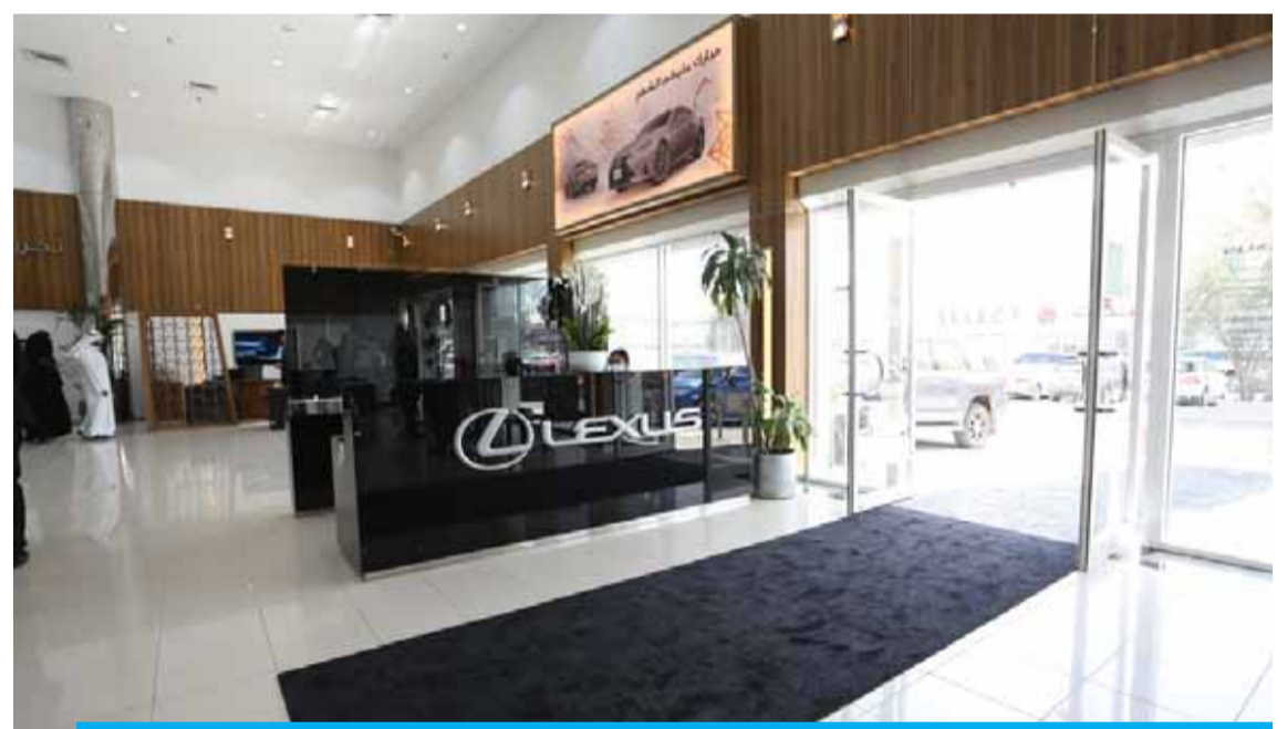
State-of-the-art Lexus showroom and service facility