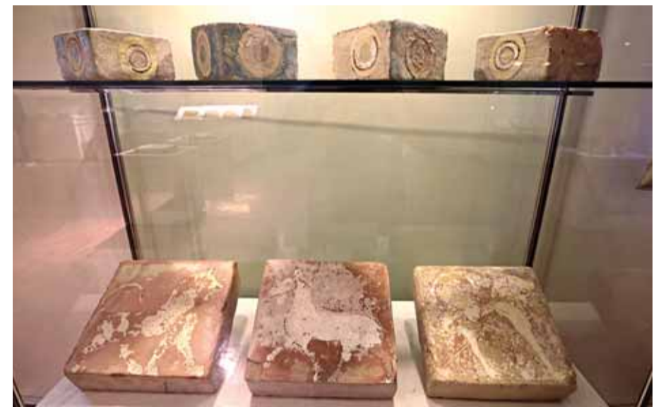
A picture shows Boukan glazed bricks repatriated from Switzerland on display.

Legal proceedings dragged on for more than a decade, with a lawsuit filed by the National Museum in 2015, and