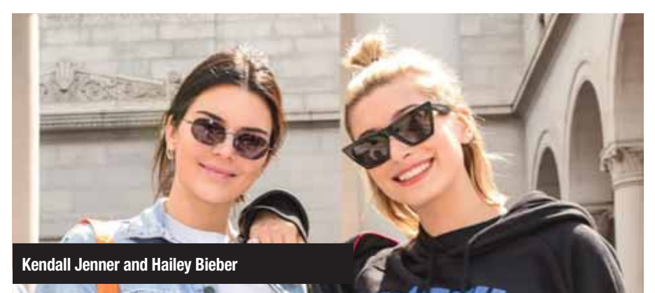
Kendall Jenner and Hailey Bieber