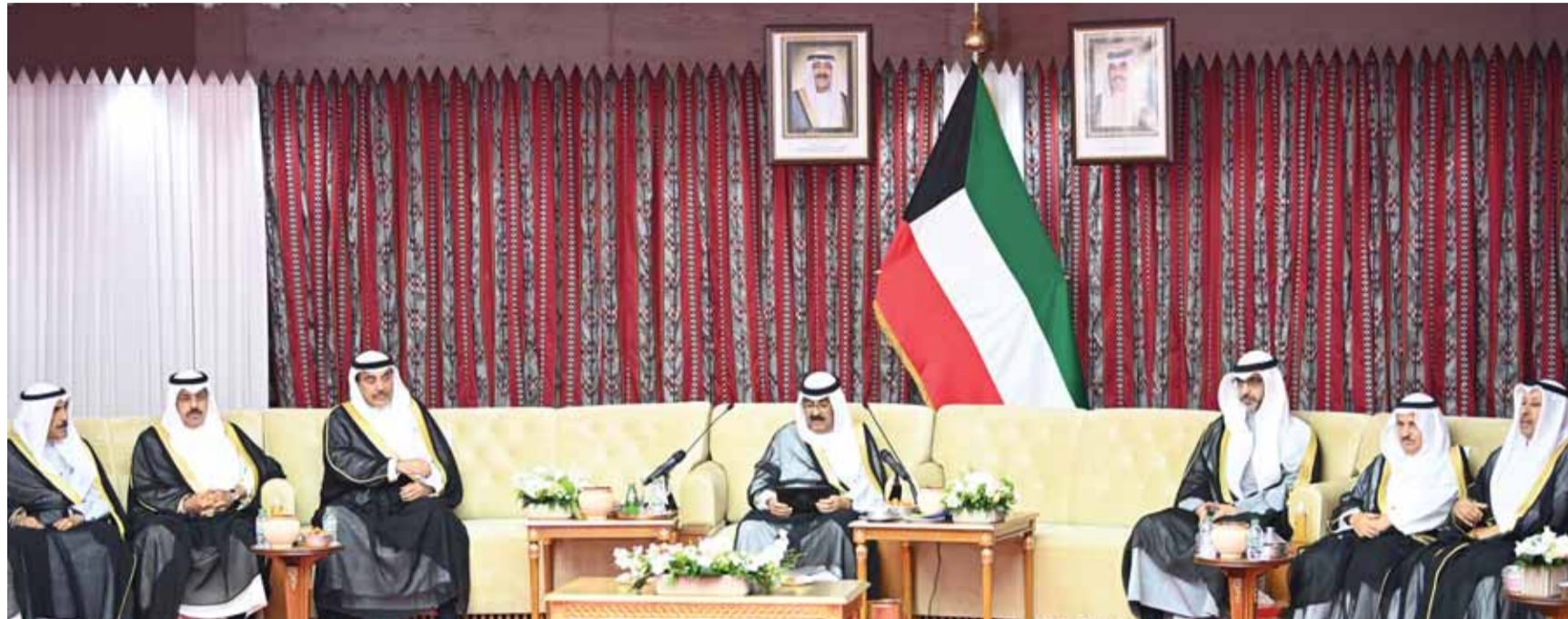
KUWAIT: His Highness the Crown Prince Sheikh Mishal Al-Ahmad Al-Jaber Al-Sabah delivers a speech during his visit to 'Al-Nabat' Traditional Poets Diwaniya.