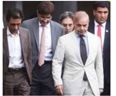
No surprises as Pakistan's new premier names cabinet