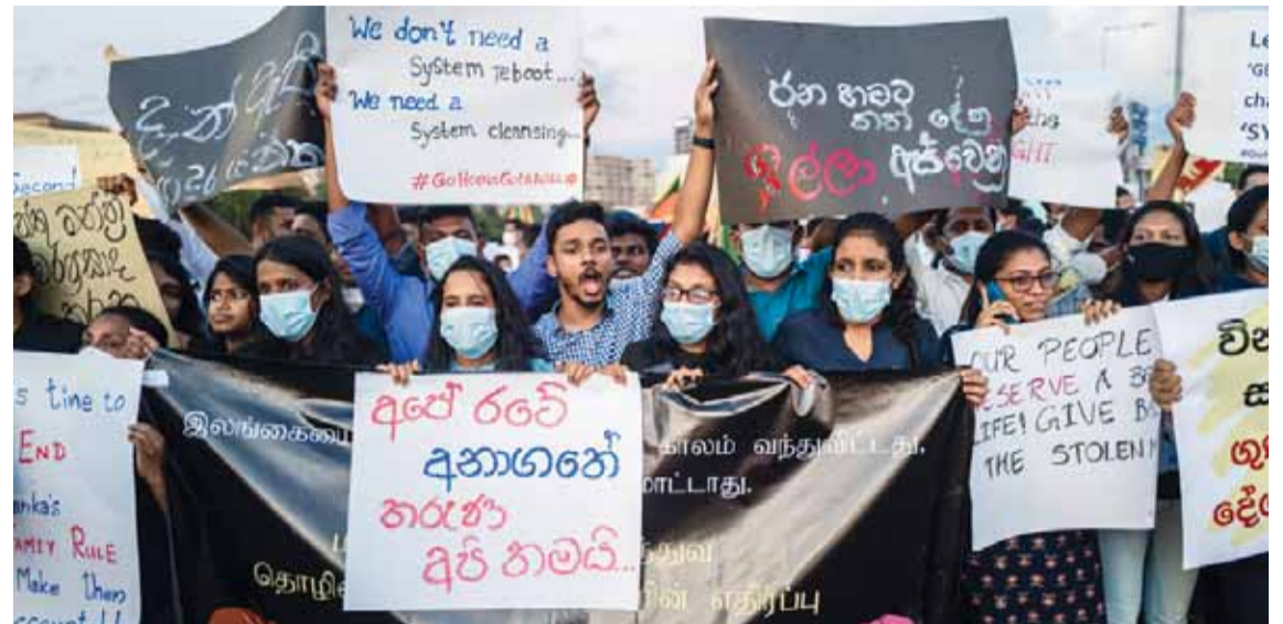
COLOMBO: Protesters shout slogans during an ongoing anti-government demonstration near the president's office in Colombo on April 18, 2022, demanding President Gotabaya Rajapaksa's resignation over the country's crippling economic crisis.

Dozens of Rajapaksa's lawmakers have turned against the administration and on Tuesday took seats on opposition benches in parliament.