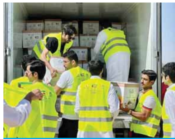
Kuwaiti students help distribute food to Syrian refugees in Jordan.