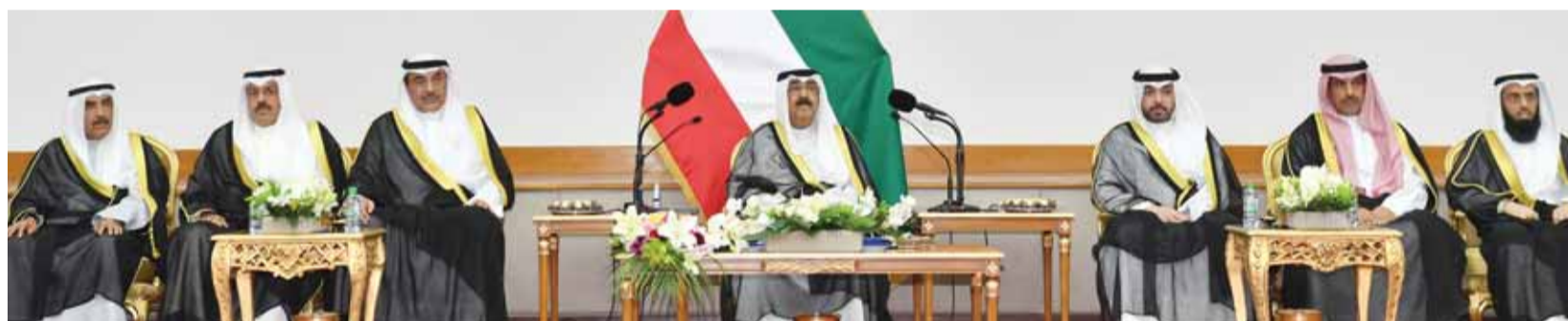
KUWAIT: His Highness the Crown Prince Sheikh Mishal Al-Ahmad Al-Jaber Al-Sabah delivers a speech during his visit to Kuwait Sports Club for the Deaf.