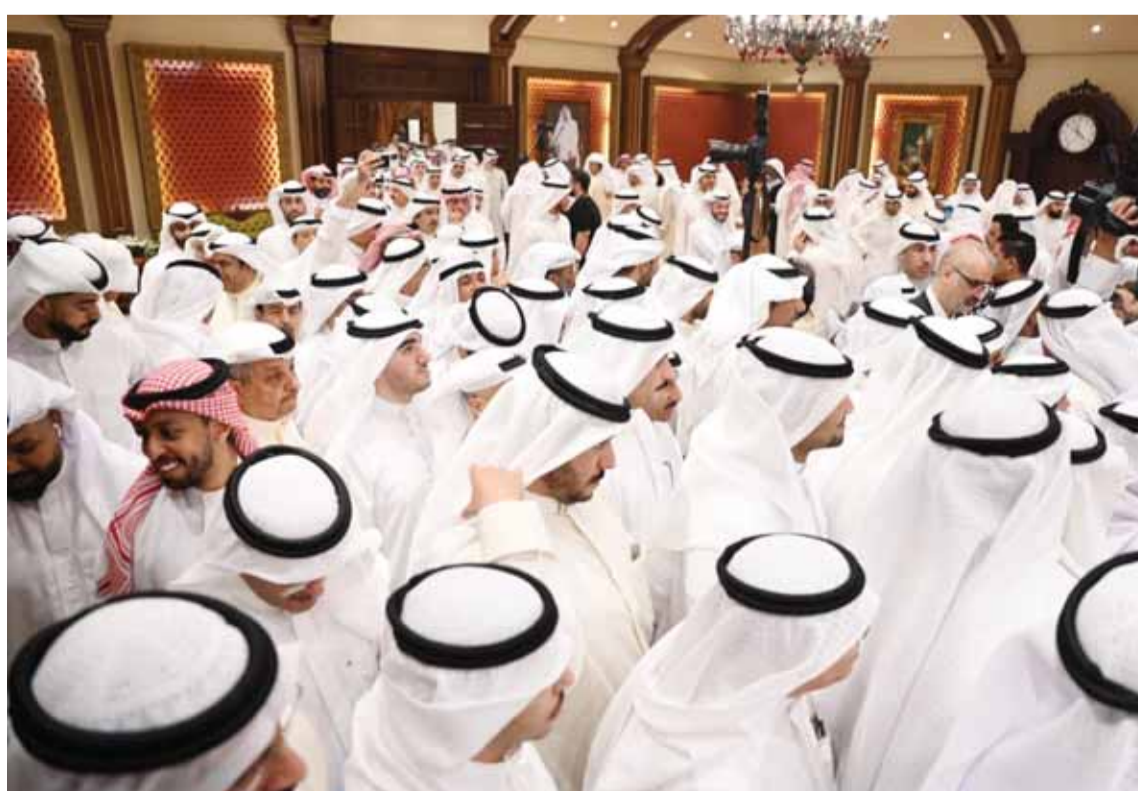
A large gathering at the reception.