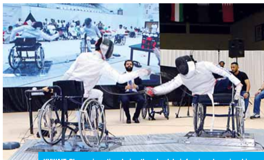
KUWAIT: Players in action during the wheelchair fencing championship.