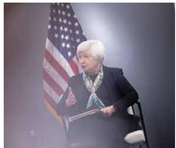
WASHINGTON, US: In this file photo taken on April 13, 2022, US Secretary of the Treasury Janet Yellen speaks at the Atlantic Council in Washington, DC.