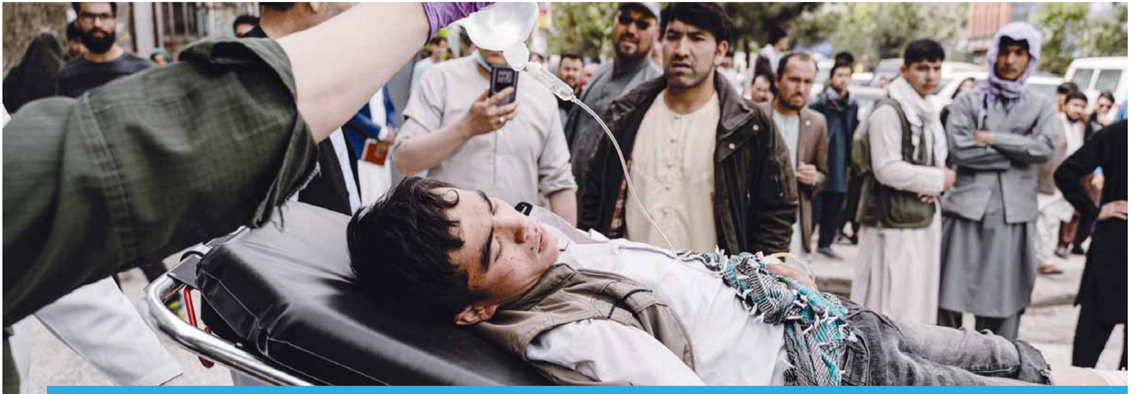
KABUL: Medical staff move a wounded youth on a stretcher outside a hospital in Kabul on April 19, 2022, after two bomb blasts rocked a boys' school in a Shiite Hazara neighbourhood killing at least 6 people.