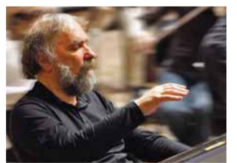
Romanian piano legend Radu Lupu

Lupu won the George Enescu International Piano Competition in 1967, nine years after the prestigious festival was set up in honour of Romanian composer George Enescu. "We will forever cherish his amazing way to transform music into magic. Words are not enough to express our sadness for this loss of the entire music world," the festival said.