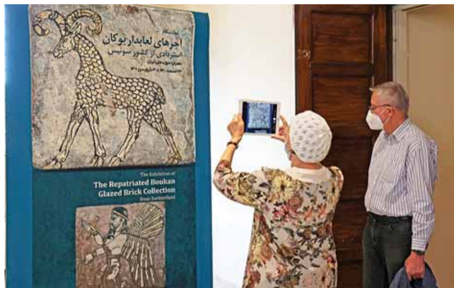
Visitors attend an exhibition entitled the Repatriated Boukan Glazed Brick Collection from Switzerland.

Those 29 pieces, from the Bronze Age to the Islamic period, are now also on display at the museum, while the quest to recover other stolen and lost artifacts