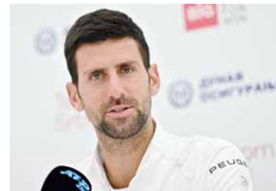
BELGRADE: Serbia's Novak Djokovic attends a press conference during the Serbia Tennis Open ATP 250 series tournament on April 18, 2022.

Top seed Djokovic will face a compatriot when he