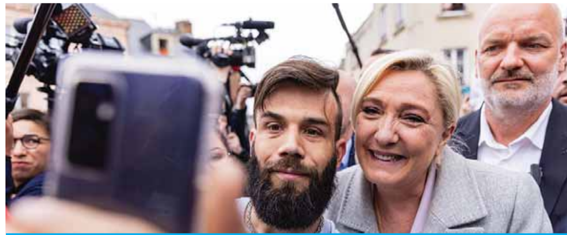
SAINT-PIERRE-EN-AUGE, France: French far-right Rassemblement National (RN) party Member of Parliament and presidential candidate Marine Le Pen (C) poses for photos with members of the public during a campaign visit to Saint-Pierre-en-Auge, northwestern France, on April 18, 2022.