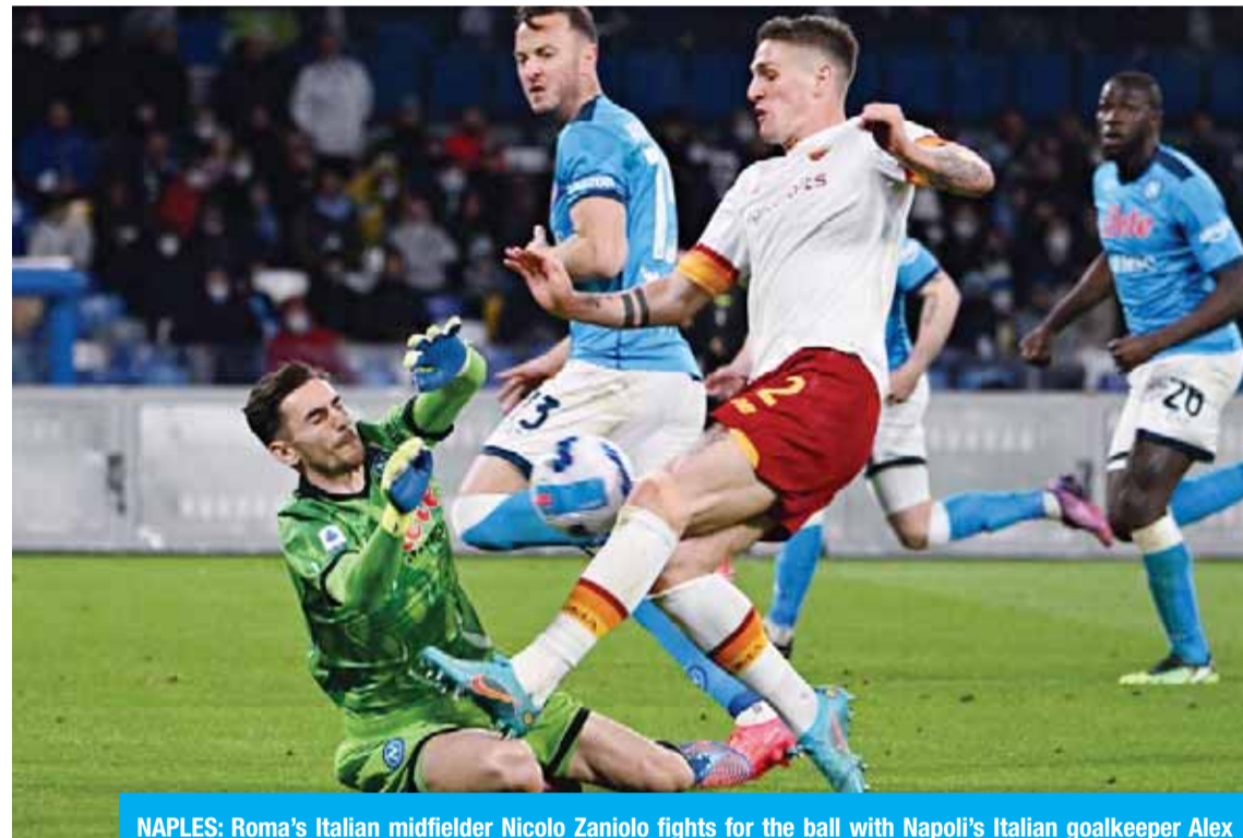
NAPLES: Roma's Italian midfielder Nicolò Zaniolo fights for the ball with Napoli's Italian goalkeeper Alex Meret during their Italian Serie A match at the Diego Armando Maradona stadium on April 18, 2022.

The referee initially did not award a penalty, but after a VAR review, he pointed to the spot and Insigne picked out the bottom corner to score his ninth league goal of the season. The home side could have doubled their advantage in the 20th minute, but Victor Osimhen's shot was blocked by Chris Smalling and visiting goalkeeper Rui Patricio