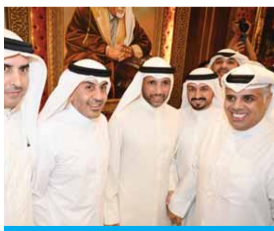
Marzouq Al-Ghanem with Minister of Public Works Ali Al-Mousa.