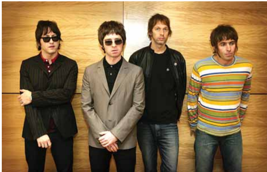
In this file photo from (left) Gem, Noel Gallagher, Andy Bell and Liam Gallagher, members of the British rock band "Oasis" posing for a photocall in Hong Kong.

He has featured on songs since then, including on his cousin Baby Keem's latest album. There have been a number of false alarms of new music from the decorated artist—but Monday's announcement seemed to be the most concrete indication of the rapper's plans yet. "All factual information for this release will come directly from this source only," read the statement he linked to.