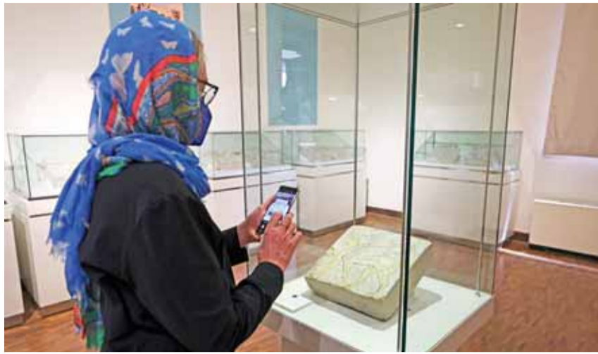
A visitor attends an exhibition entitled the Repatriated Boukan Glazed Brick Collection from Switzerland, at Iran's National Museum in Tehran.