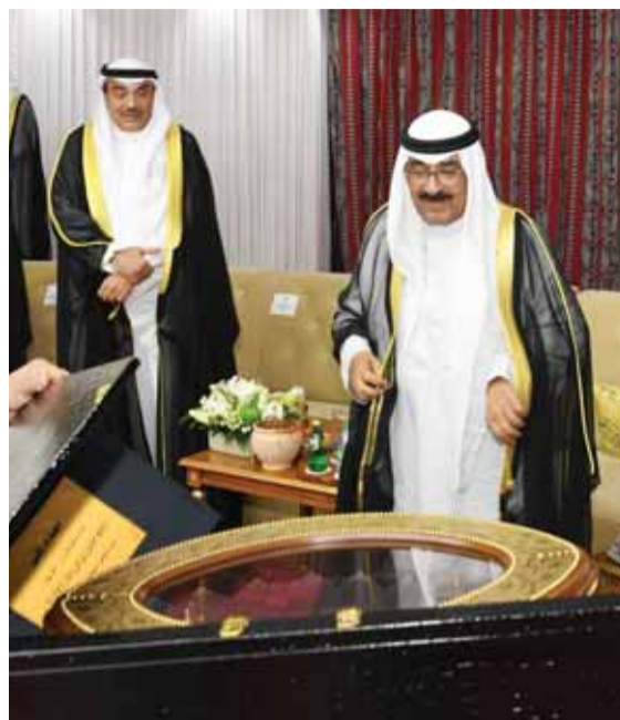
KUWAIT: His Highness the Crown Prince Sheikh Mishal Al-Ahmad Al-Jaber Al-Sabah receives a souvenir during his visit.