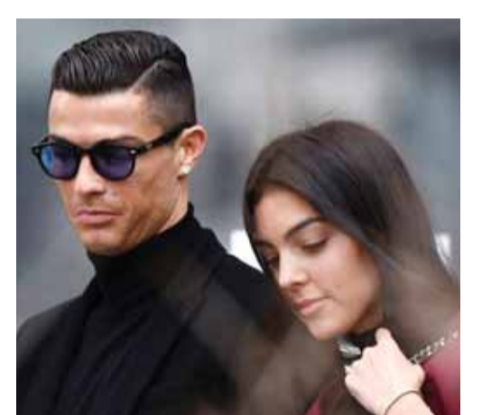
Cristiano Ronaldo and Georgina Rodriguez

Toronto jumped ahead 11-2 but the Sixers grabbed a 67-52 halftime lead and pulled away in the third quarter. The Raptors, led by 26 points from O G Anunoby and 20 points each from Pascal Siakam and Fred VanVleet, trimmed their deficit in the final minutes but never threatened. Embiid suffered a right elbow injury late in the third quarter but played to the finish. "It was pretty sore," he said. "But it's the playoffs. Got to fight through it." — AFP