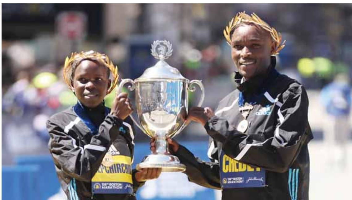
BOSTON: Peres Jepchirchir of Kenya and Evans Chebet of Kenya pose for a portrait with the trophy after placing first in the professional women's and men's division during the 126th Boston Marathon on April 18, 2022.