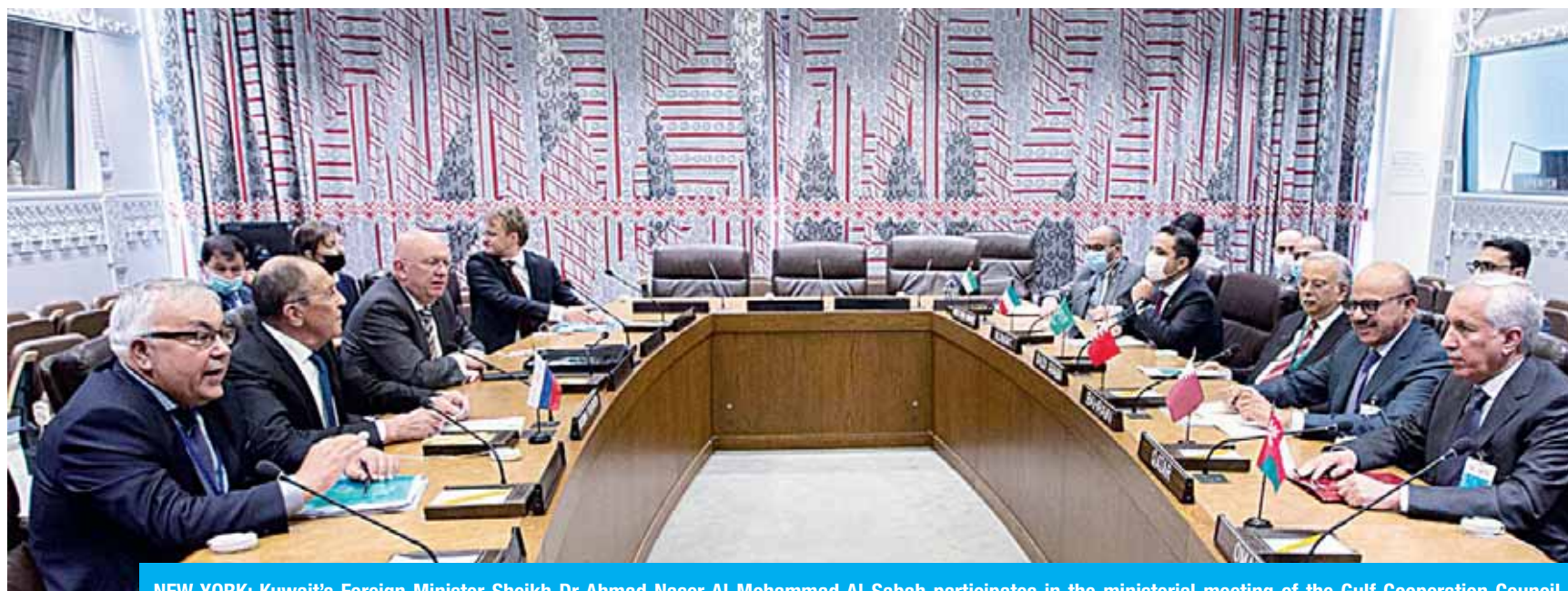
NEW YORK: Kuwait's Foreign Minister Sheikh Dr Ahmad Naser Al-Mohammad Al-Sabah participates in the ministerial meeting of the Gulf Cooperation Council member states and Russia.

In the meantime, Sheikh Dr Ahmad met on Friday with UN Relief and Works Agency for Palestine Refugees in the Near East (UNRWA) Commissioner-General Philippe Lazzarini, on the sidelines of the UN General Assembly session. During the meeting, Sheikh Dr Ahmad expressed his utmost thanks and appreciations on behalf of the state of Kuwait to UNRWA's work and its refugee,