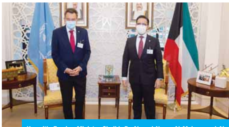
Kuwait's Foreign Minister Sheikh Dr Ahmad Naser Al-Mohammad Al-Sabah meets President of the International Committee of the Red Cross Peter Maurer.