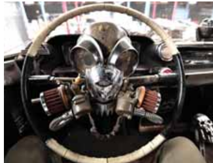
The steering wheel and gearshift knob of the Gigahorse's driver's seat.

If you need a ride fast enough to outpace the apocalypse, a rare auction in Australia is selling a menacing fleet of vehicles from "Mad Max: Fury Road" for any aspiring desert warrior. Whether you're a would-be marauder or just want to raise eyebrows at the drive-through window, the sale of 13 vehicles from the 2015