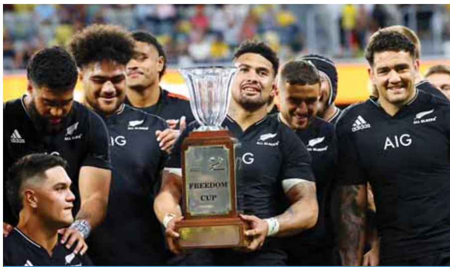
TOWNSVILLE: New Zealand's captain Ardie Savea celebrates winning Freedom Cup with teammates after the rugby Championship match against South Africa in Townsville yesterday.

Australia, who beat South Africa twice before dismantling Argentina, move up to second on 13 points, two clear of the Springboks, with the Pumas flailing at the bottom. New Zealand and