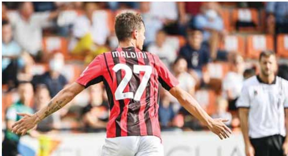
LA SPEZIA: AC Milan's Italian forward Daniel Maldini celebrates after opening the scoring during the Italian Serie A football match between Spezia and AC Milan yesterday at the Alberto-Picco stadium in La Spezia.

Maldini's fairytale debut looked to have