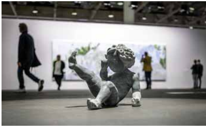
Visitors walk past "Untitled" an artwork by Italian painter and key member of the Italian Transavanguardia movement Enzo Cucchi.

The US artist Lari Pittman is presenting a vast set of closely-juxtaposed paintings intended as a kind of snapshot of a fallen Western civilization. "It's a cabinet of curiosities," the Californian told AFP, but with objects amassed by a collector "in the distant future", finding needles and antidepressants, a motorway sign warning drivers to speed up due to the risk of cannibalism, and stained glass windows for an underground bunker. The work should have been exhibited before the pandemic, but Pittman nonetheless believes it has its