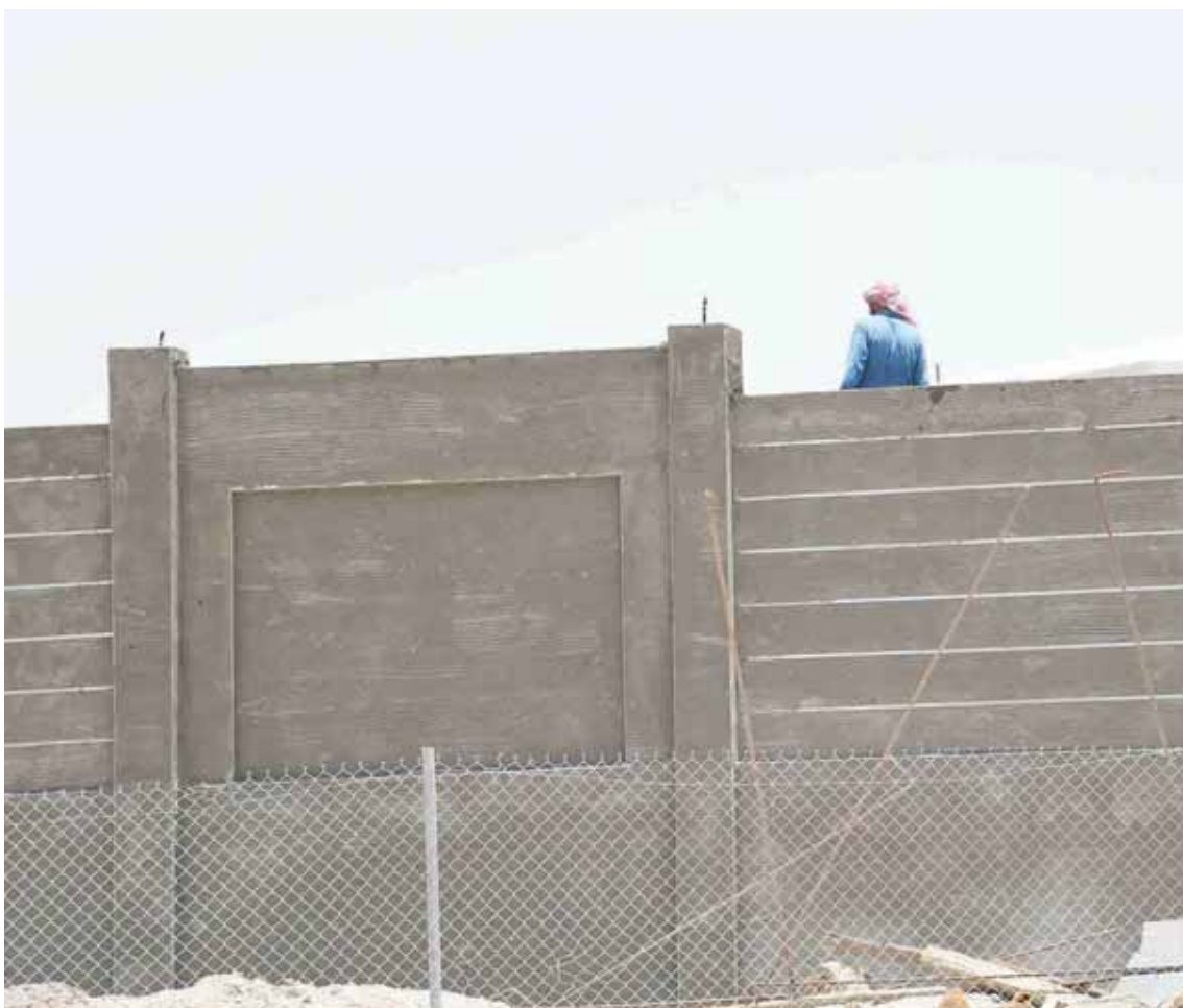
KUWAIT: This archive photo shows a worker at a construction site in Kuwait.

Meanwhile, a labor market information system report showed that Indians form the largest number of those who left the marketplace in the first