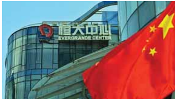
Investors are keeping a close eye on developments surrounding troubled Chinese developer Evergrande.

The supply chain woes were highlighted by sports giant Nike Thursday as it cut its sales forecast for the coming quarters. Brent oil prices, meanwhile, jumped to a three-year peak, boosted by tight supplies particularly in the United States