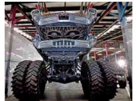
The rear view of the Gigahorse.

With offers closing on Sunday, the current owners will only sell all 13 together in an effort to preserve a piece of film history. "They shouldn't be sitting in storage; they should be out there and getting the respect that they deserve," McKew said. Although they certainly wouldn't "go for cheap", it was hard to put a price on the fleet, he added. The vehicles are part of an armada of wild machines that burst onto the screen in the award-winning Fury