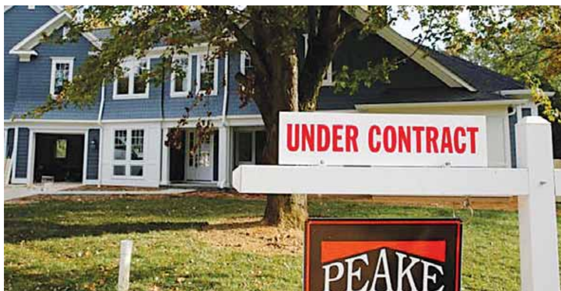
WASHINGTON: Sales of new homes rose faster than analysts expected last month in the United States, according to government data released Friday.

There have been calls to deploy soldiers to help deliver petrol, while some have also suggested using them to process the backlog of HGV license applications that has ballooned during the pandemic. —AFP