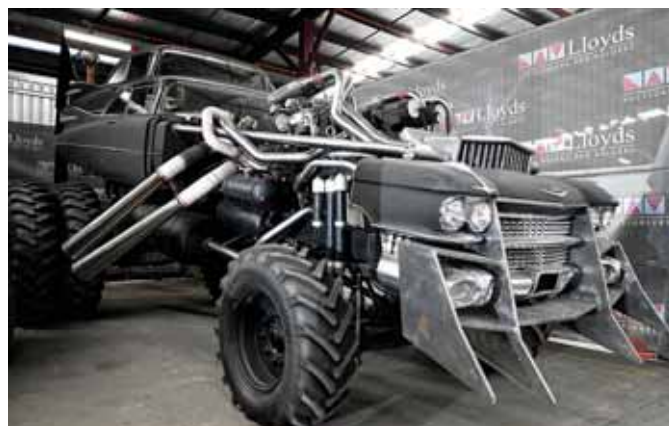
This picture taken on Friday shows the Gigahorse, one of several outlandish vehicles used in the 2015 dystopian blockbuster film "Mad Max: Fury Road", which is up for bids at Lloyds Auctions in Sydney.