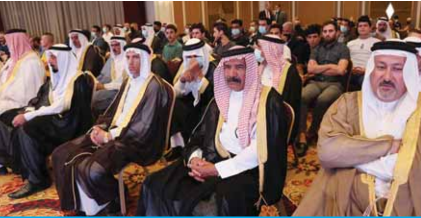
ARBIL: Iraqis attend a conference organized by US think-tank Center for Peace Communications on Friday.