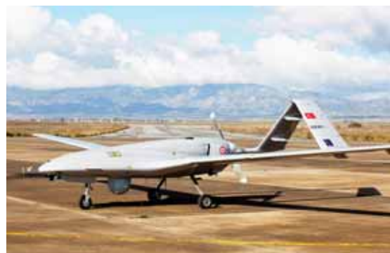
LEFKONAIKO: In this file photo, the Turkish-made Bayraktar TB2 drone is pictured at Gecitkale military airbase near Famagusta in the self-proclaimed Turkish Republic of Northern Cyprus (TRNC).

The viral video from Thursday showed police in riot gear beating a protestor who had fallen to the ground seconds after gunshots were heard. A photographer, hired by district officials to film the evictions, jumped on the man and was seen punching the body multiple times. The photographer has since been arrested, according to police. Leaders of India's 170 million Muslims say they have been unfairly targeted since Modi's party came to power in 2014. They say a controversial nationality law that sparked riots in Delhi in 2020, and hate crimes including lynchings, have all increased fear in their community.— AFP