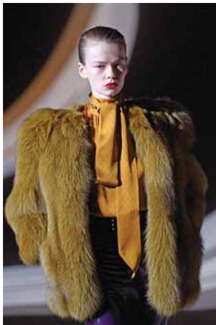
In this file photo taken on Feb 25, 2020, a model presents a creation for Yves Saint Laurent.

"There is nothing glamorous about fur," PETA told Saint Laurent. Within the Kering group, Gucci was the first to drop fur in 2017, followed by Balenciaga, Bottega Veneta et Alexander McQueen. "The world has changed, along with our clients, and luxury naturally needs to adapt to that," Kering CEO Francois-Henri Pinault said in a statement. Kering would be entirely fur-free from the Fall 2022 collections.