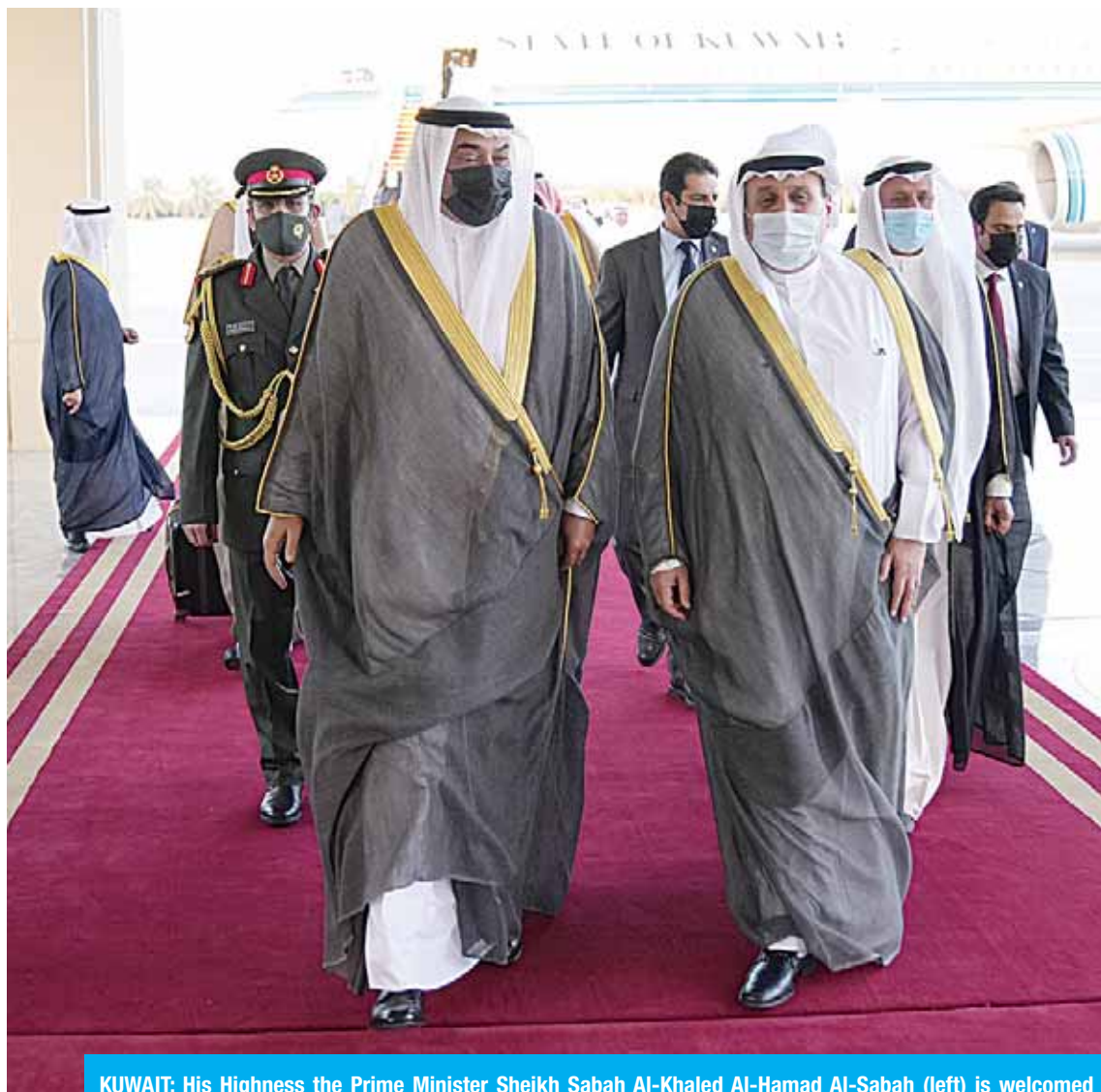
KUWAIT: His Highness the Prime Minister Sheikh Sabah Al-Khaled Al-Hamad Al-Sabah (left) is welcomed upon arrival in Kuwait yesterday.