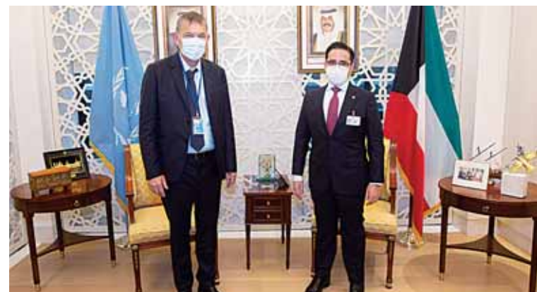
Kuwait's Foreign Minister Sheikh Dr Ahmad Naser Al-Mohammad Al-Sabah meets the UNRWA Commissioner-General Philippe Lazzarini.

In other news, Kuwait's Foreign Minister held separate meetings on the sidelines of the UN General Assembly session with Nepalese Foreign Minister Dr Narayan Khadka, Senegalese Foreign Minister Aissata Tall Sall, Foreign Minister of Kyrgyzstan Ruslan Kazakbaev, and Thailand's Minister of Foreign Affairs Don Pramudwinai, discussing with them boosting bilateral relations as well as several regional and international issues of common interest. —KUNA