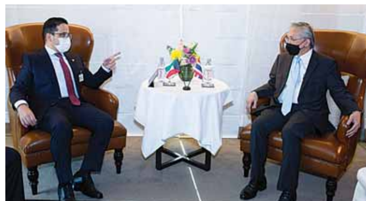
Kuwait's Foreign Minister Sheikh Dr Ahmad Naser Al-Mohammad Al-Sabah meets Thailand's Minister of Foreign Affairs Don Pramudwinai.