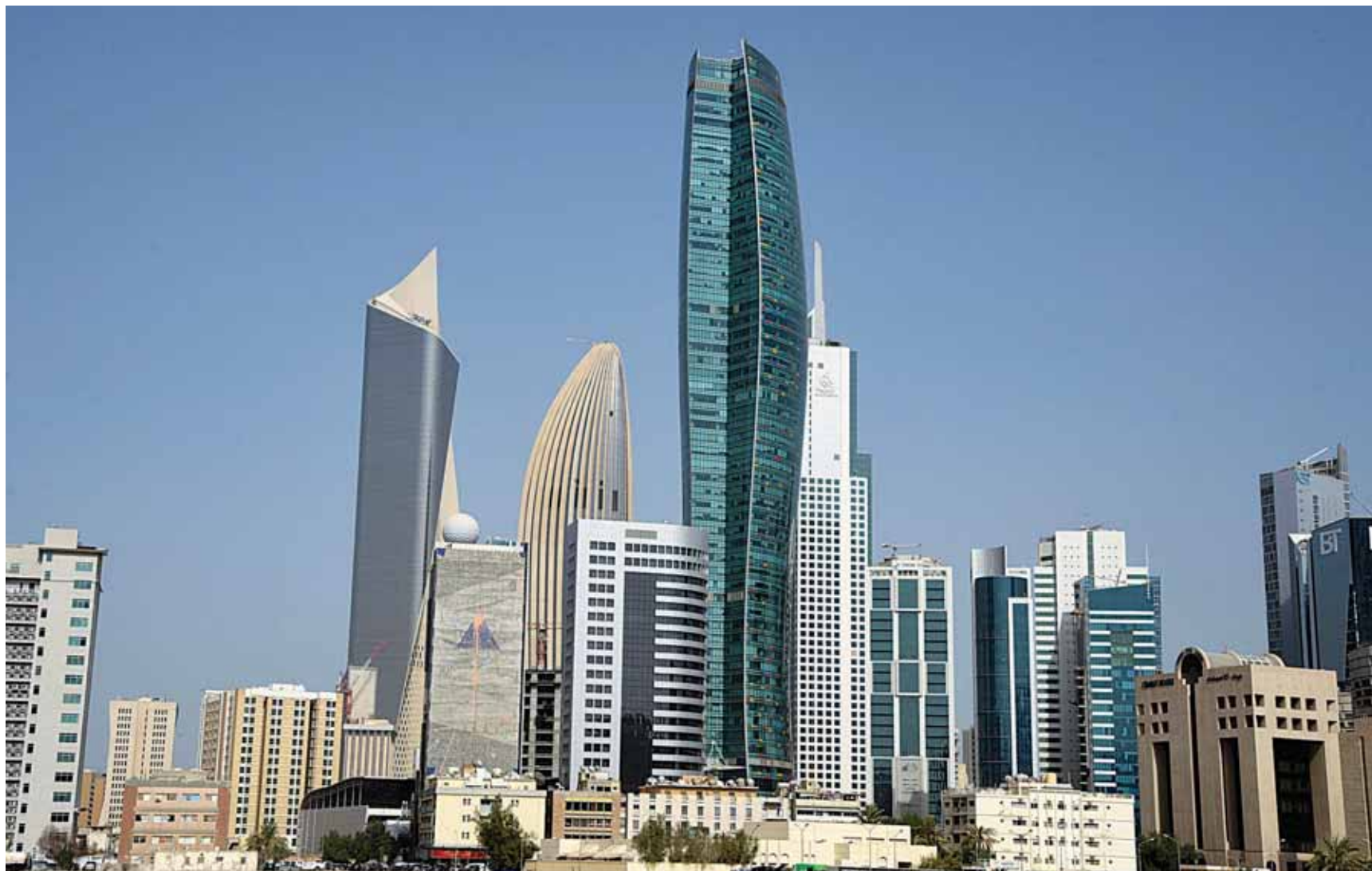
KUWAIT: A picture taken on September 20, 2021 shows high-rise buildings in Kuwait City. (To have your picture featured in the Kuwait Times' 'Photo of the Day' section, please send your high resolution, horizontal, unedited photos to local@kuwaittimes.com, along with the full name and Instagram account, in addition to a description showing the picture's location and date taken)