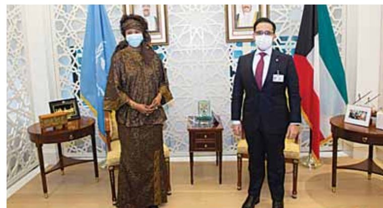
Kuwait's Foreign Minister Sheikh Dr Ahmad Naser Al-Mohammad Al-Sabah meets Senegalese Foreign Minister Aissata Tall Sall.