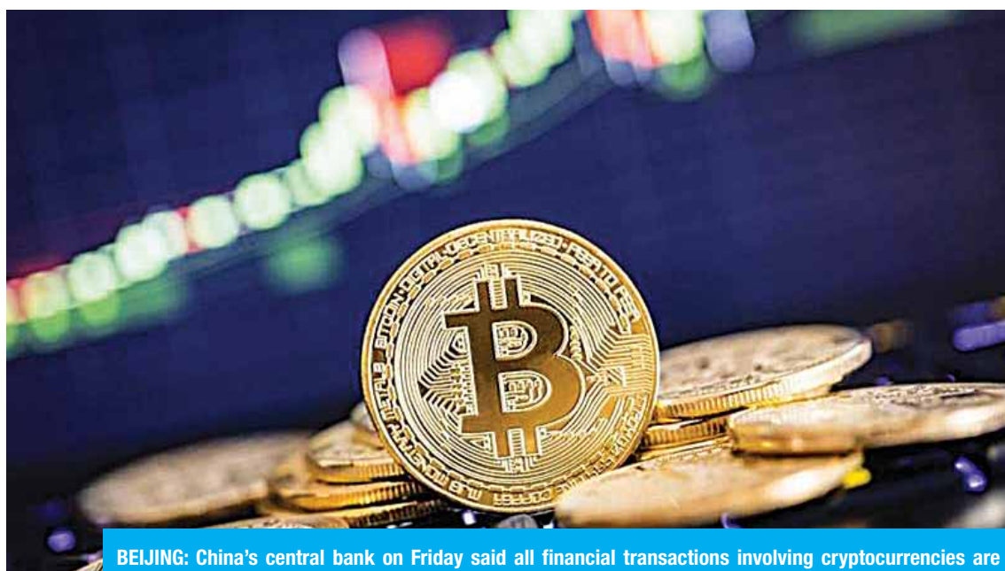
BEIJING: China's central bank on Friday said all financial transactions involving cryptocurrencies are illegal.

"China's ban on all cryptocurrency trading activi-