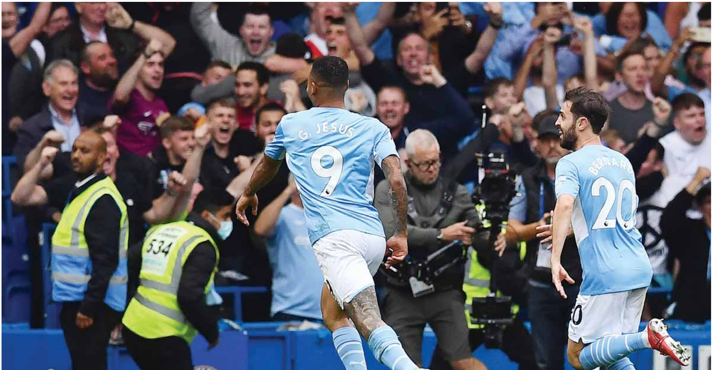
LONDON: Manchester City's Brazilian striker Gabriel Jesus (left) celebrates scoring his team's first goal during the English Premier League football match between Chelsea and Manchester City at Stamford Bridge in London yesterday.

Man Utd pay penalty • Everton beat Norwich • West Ham overcome Leeds