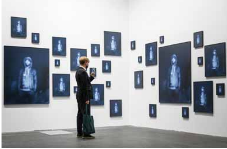
A visitor takes a photo with his mobile phone of "Repeating the Obvious, 2019", an artwork by US artist Carrie Mae Weems, exhibited in the Unlimited sector of Art Basel.