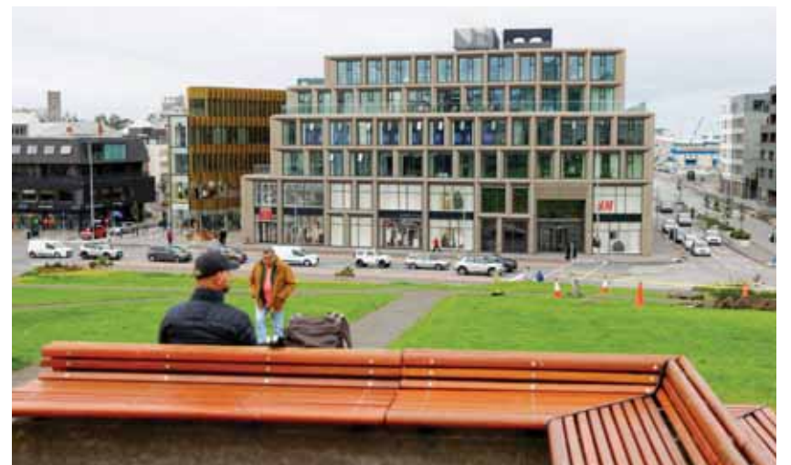
REYKJAVIK: People are seen in a park in Reykjavik, the capital of the north atlantic island of Iceland.

While she is broadly popular, her party is hovering around 10-12 percent in the polls and risks losing several seats. During her four-year term, Jakobsdottir has introduced a pro-