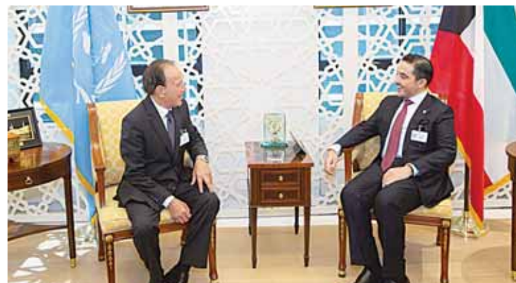
Kuwait's Foreign Minister Sheikh Dr Ahmad Naser Al-Mohammad Al-Sabah meets Nepalese Foreign Minister Dr Narayan Khadka.