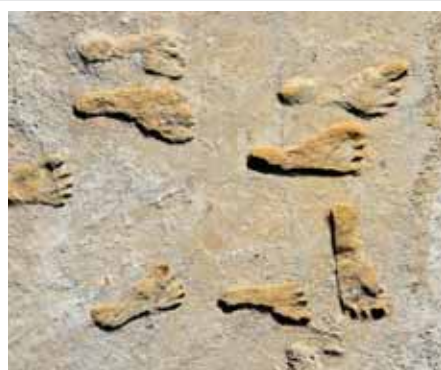
Fossilized footprints found in New Mexico.

The Americas were the last continent to be reached by humanity. For decades, the most commonly accepted theory has been that settlers came to North America from eastern Siberia across a land bridge - the present-day Bering Strait. From Alaska, they headed south to kinder climes. Archaeological evidence, including spearheads used to kill mammoths, has long suggested a 13,500-year-old settlement