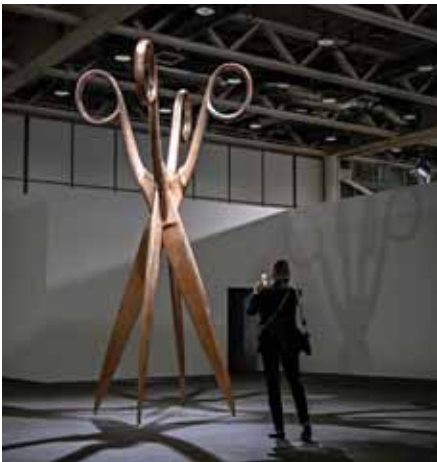
A visitor takes a photo of "Die Doppelgängerin, 2010", an artwork by Austrian avant-garde artist Valie Export depicting two intertwined scissors.

D ystopia and Black Lives Matter feature prominently at Art Basel, the world's top contemporary art fair, which throws open its doors to the public this weekend. The giant annual fair in the Swiss city of Basel is above all a commercial event, where artists and galleries come to meet wealthy collectors. But the fair is also very popular with art lovers who come for the simple pleasure of browsing the works on show. Some 93,000 visitors