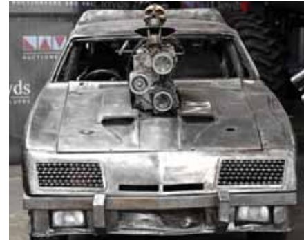
The Razor Cola.

But these younger Taliban do listen to music - even if most of it is religious. Since the group's return to power in mid-August, even its leaders seem to have relaxed slightly on the topic - at least in larger