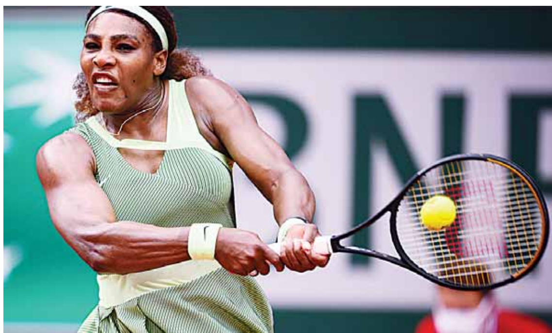
PARIS: In this file photo taken on June 4, 2021, Serena Williams of the US returns the ball to Danielle Collins of the US during their women’s singles third round tennis match on Day 6 of The Roland Garros 2021 French Open tennis tournament in Paris.

“At the very beginning, she was very lacking in confidence. She was not herself. But I knew who she was,” Mouratoglou explained. “When she qualified for the semi-finals at Wimbledon in 2012,