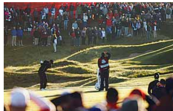
KOHLER: Dustin Johnson of team United States plays his shot on the first hole during Saturday Morning Foursome Matches of the 43rd Ryder Cup at Whistling Straits yesterday in Kohler, Wisconsin.

Harrington benched Rory McIlroy for yesterday’s opening foursomes matches after the four-time major winner lost twice in one day for the first time in his Ryder Cup career. “The golf didn’t go as well as he would have liked, but I’m not second-guessing