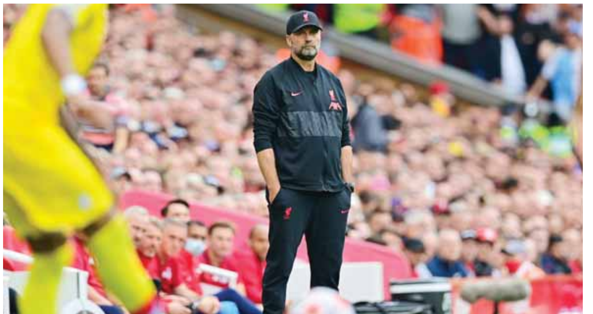
LIVERPOOL: Liverpool's German manager Jurgen Klopp looks on during the English Premier League football match between Liverpool and Crystal Palace at Anfield in Liverpool, north west England on September 18, 2021.

Emerson Royal, who joined Tottenham from Barcelona on the last day of the summer transfer window, is also in the squad. Brazil have won all eight of their qualifiers and play Venezuela on