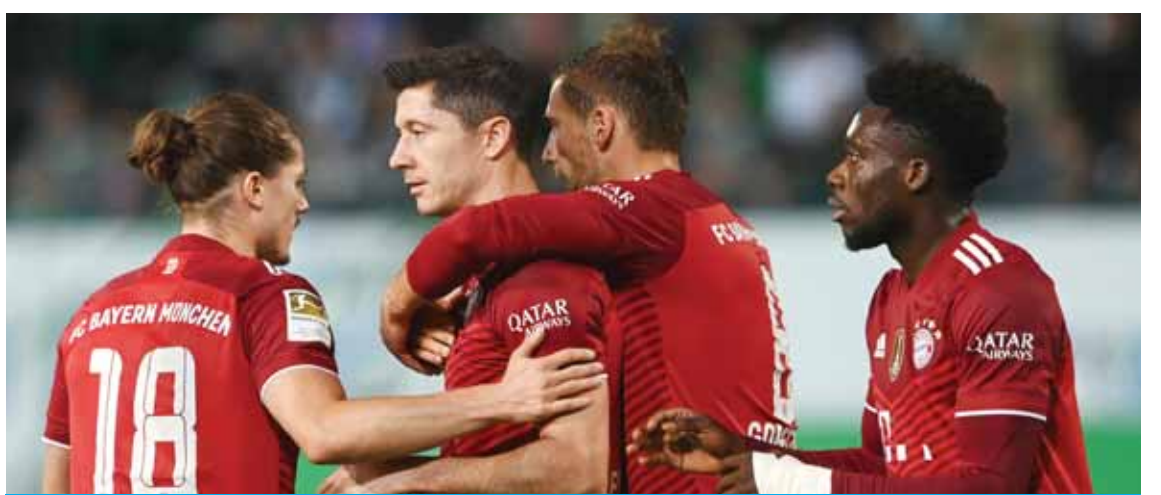
FUERTH: (From left) Bayern Munich's Marcel Sabitzer, Robert Lewandowski, Leon Goretzka and Alphonso Davies celebrate after the third goal for their team during their German first division Bundesliga football match against Greuther Fuerth on Friday.