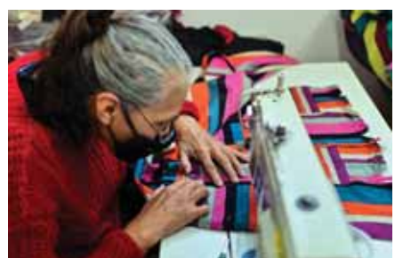
A woman works on making garments made with fabrics created in Mexican indigenous communities at "Fabrica Social" (Social Factory) in Mexico City on Sept 7, 2021.