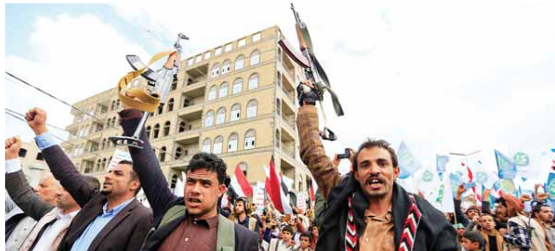
SANAA: Yemeni supporters of the Shiite Houthi movement take part in a ceremony commemorating the seventh anniversary of the Houthi takeover of the capital Sanaa.

The Houthis in February escalated their efforts to seize Marib, the government's last northern stronghold, and the fighting has killed hundreds on both sides. Control of the oil-rich region would strengthen the Houthis' bargaining position in peace talks. According to the military sources, who spoke on condition of