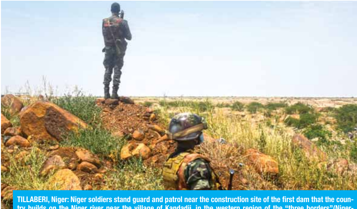
TILLABERI, Niger: Niger soldiers stand guard and patrol near the construction site of the first dam that the country builds on the Niger river near the village of Kandadji, in the western region of the "three borders" (Niger-Mali-Burkina Faso).

Burgan Bank is a majority owned subsidiary of KIPCO (Kuwait Projects Company), one of the largest holding companies in the MENA region.