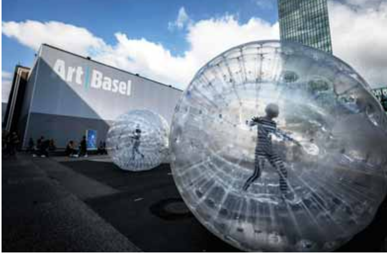
A picture taken on Sept 21, 2021 shows artists in their transparent plastic inflated plastic balls performing "Tears" by Monster Chetwynd during a preview day of Art Basel, the world's premier modern and contemporary art fair in Basel.