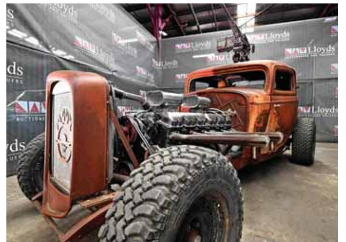
The Elvis convoy car.