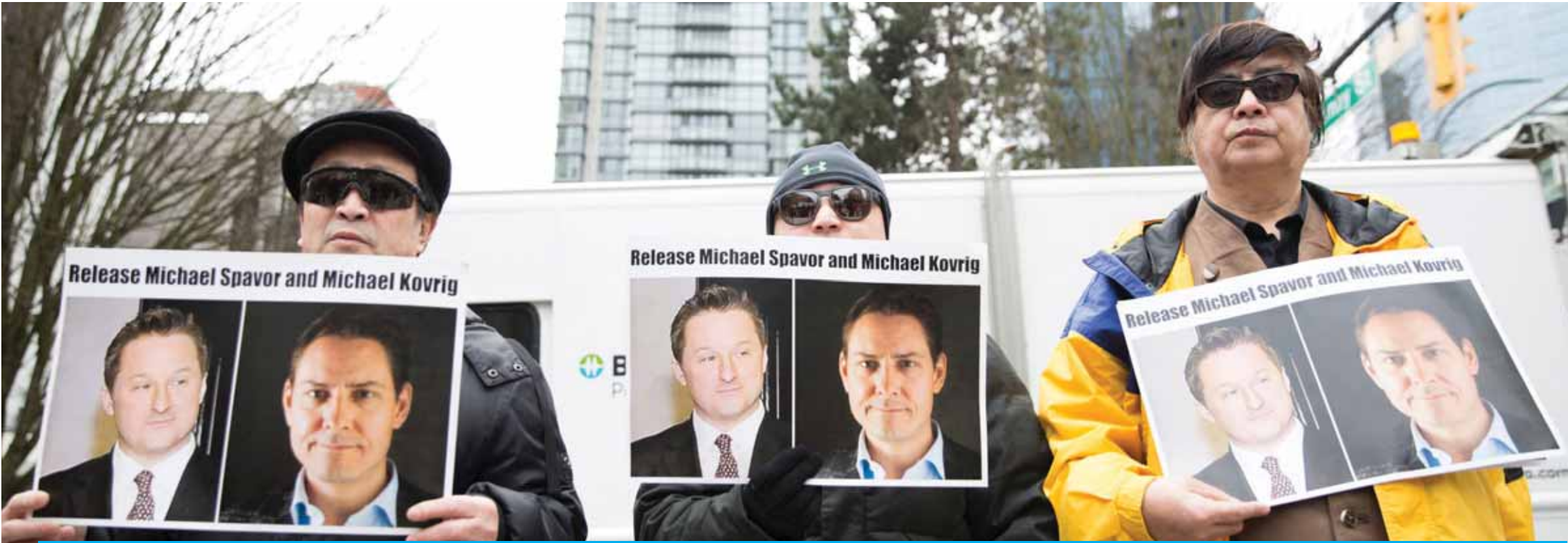
VANCOUVER: In this file photo, protesters hold photos of Canadians Michael Spavor and Michael Kovrig, who are being detained by China, outside British Columbia Supreme Court in Vancouver. Two Canadians imprisoned in what China’s Western critics branded ‘hostage diplomacy’ headed home September 24, 2021, after being released.