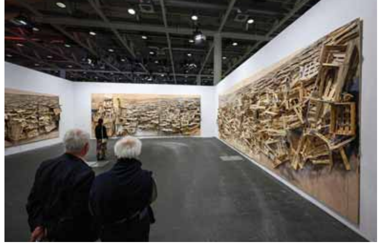
Visitors look at "Destruction" 2019, an artwork by Japanese artist Tadashi Kawamata.