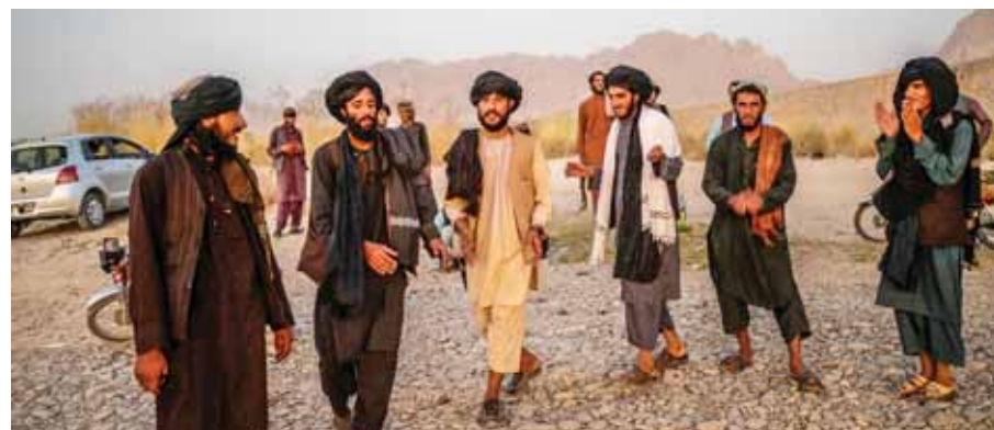
In this picture taken on Sept 23, 2021, Taliban members enjoy a traditional dance on the banks of a river in Kandahar.

they move from side to side, clapping their hands and chanting the lyrics of a patriotic Afghan song: "Send me a hello from Kabul... I miss you very much." When the Taliban ruled Afghanistan from 1996 to 2001, all entertainment, including singing