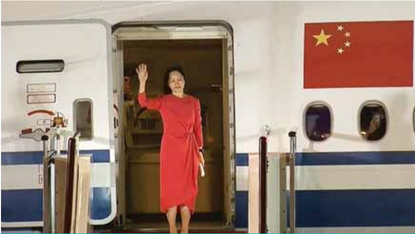
SHENZHEN: This screen grab made from video shows Huawei executive Meng Wanzhou waving as she steps out of the plane upon arrival yesterday following her release. — AFP