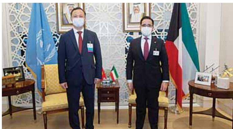
Kuwait's Foreign Minister Sheikh Dr Ahmad Naser Al-Mohammad Al-Sabah meets Foreign Minister of Kyrgyzstan Ruslan Kazakbaev.