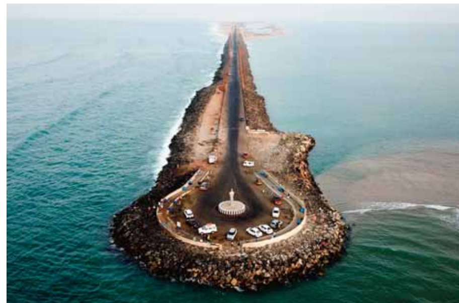
An aerial view shows visitors at the southeastern tip of Pamban Island in Tamil Nadu state in Dhanushkodi yesterday.

Born in 1968 in Chester, northwest England, to a pub landlord father and art teacher mother, Craig spent part of his childhood in Liverpool, where he moved with his mother and sister following his parents' divorce. He started acting at an early age, attending drama school in London before landing a string of roles in