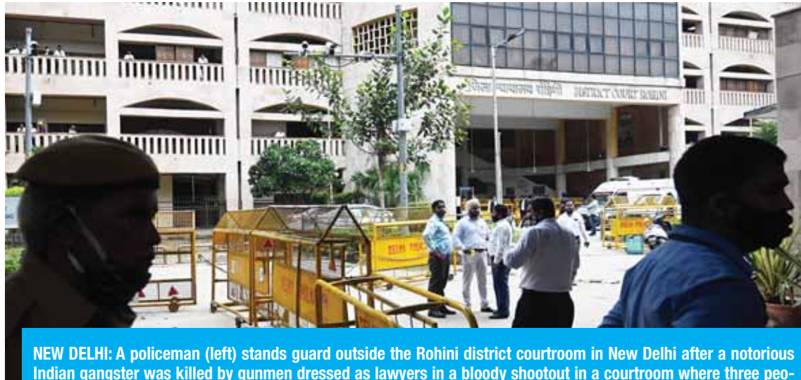
NEW DELHI: A policeman (left) stands guard outside the Rohini district courtroom in New Delhi after a notorious Indian gangster was killed by gunmen dressed as lawyers in a bloody shootout in a courtroom where three people died.