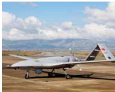
Morocco gets 1st batch of Turkish armed drones