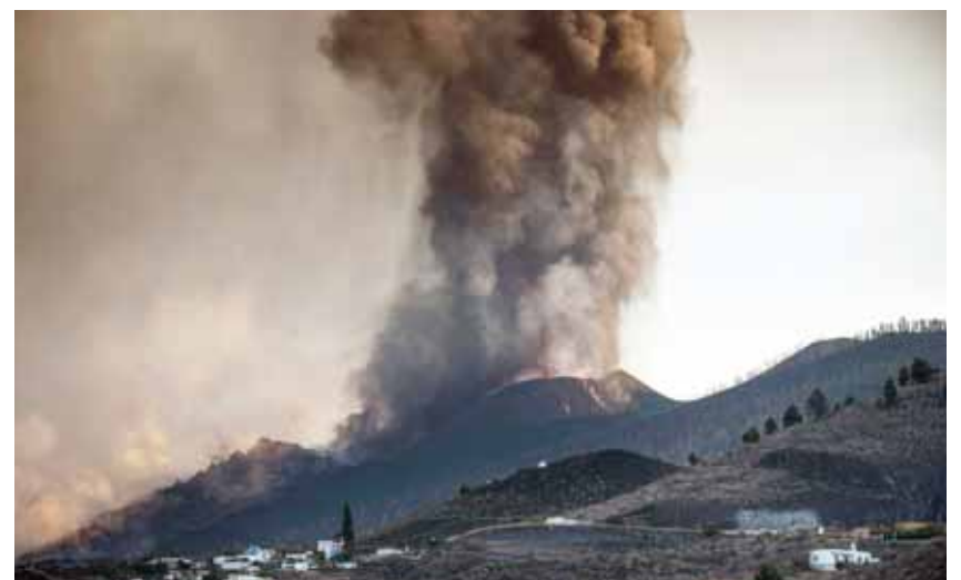
LOS LLANOS DE ARIDANE: The Cumbre Vieja volcano is seen from Los Llanos de Aridane on the Canary island of La Palma yesterday.

The speed of the lava flowing from the mouth of the volcano has steadily slowed in recent days, and experts are hoping it will not reach the coast. If the molten lava pours into the sea, experts fear it will generate clouds of toxic gas