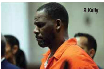
women and teenagers for his own sexual gratification.

Following 21 days of evidence including 50 witnesses and hours of searing testimony, jurors on Friday began considering whether internationally famous singer R Kelly orchestrated a sex crimes ring for nearly three decades. The case, delayed over a year by the pandemic, is seen as landmark for the #MeToo movement as it is the first major sex abuse trial where the majority of accusers are Black women. The prosecution painstakingly wove the threads of alleged wrongdoing into an intricate pattern of crimes they say the artist born Robert Sylvester Kelly perpetrated with impunity, capitalizing on his fame to prey on young