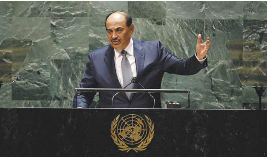
NEW YORK: HH the Prime Minister of Kuwait Sheikh Sabah Al-Khaled Al-Hamad Al-Sabah addresses the General Debate of the 76th Session of the United Nations General Assembly at UN headquarters on Friday. — AFP

Kuwait urges Iran to adopt 'serious measures' to build regional confidence