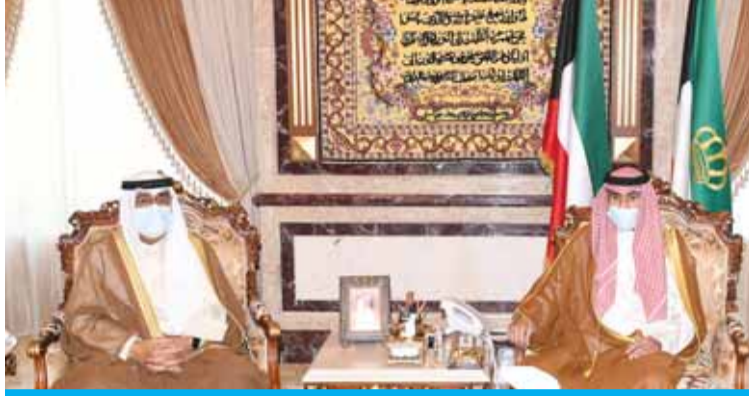
KUWAIT: His Highness the Amir Sheikh Nawaf Al-Ahmad Al-Jaber Al-Sabah meets His Highness the Crown Prince Sheikh Mishal Al-Ahmad Al-Jaber Al-Sabah.