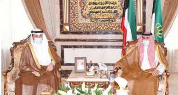
His Highness the Amir Sheikh Nawaf Al-Ahmad Al-Jaber Al-Sabah meets National Assembly Speaker Marzouq Al-Ghanem.