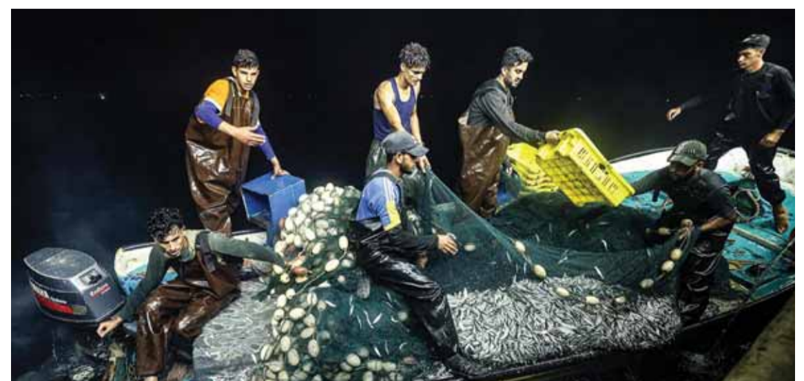
GAZA: Palestinian fishermen unload their catch from a boat upon their return to the coastline of Gaza City on Sept 22, 2021.

Around 120,000 bedoons, who have been living in Kuwait for decades, claim they are citizens and deserve to get Kuwaiti citizenship. But authorities say a majority of them or their forefathers came to Kuwait from neighboring countries and destroyed their identification documents in order to get Kuwaiti nationality.