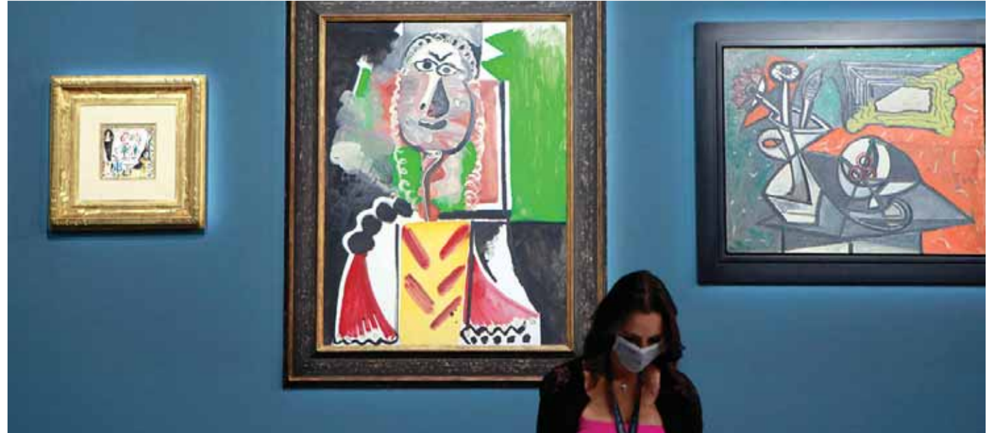
A guest takes a personal photograph of Spanish artist Pablo Picasso's 'Pierrot,' (left) near 'Homme et enfant' before the start of a Sotheby's auction of 11 works by Pablo Picasso from the MGM Resorts Fine Art Collection in Las Vegas.