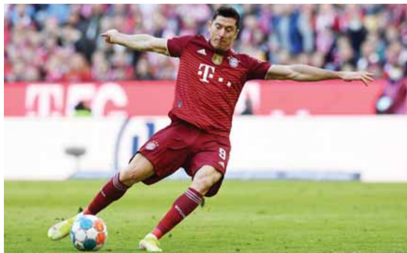
MUNICH: Bayern Munich's Polish striker Robert Lewandowski plays the ball during his team's first division Bundesliga football match against Hoffenheim in Munich, southern Germany, on Saturday.

"We wanted to give an answer here to the game on Tuesday, which was unfortunately, a step backwards," admitted Hummels. With regular penalty-taker Erling Braut Haaland sidelined with a hip injury, Can stepped up to