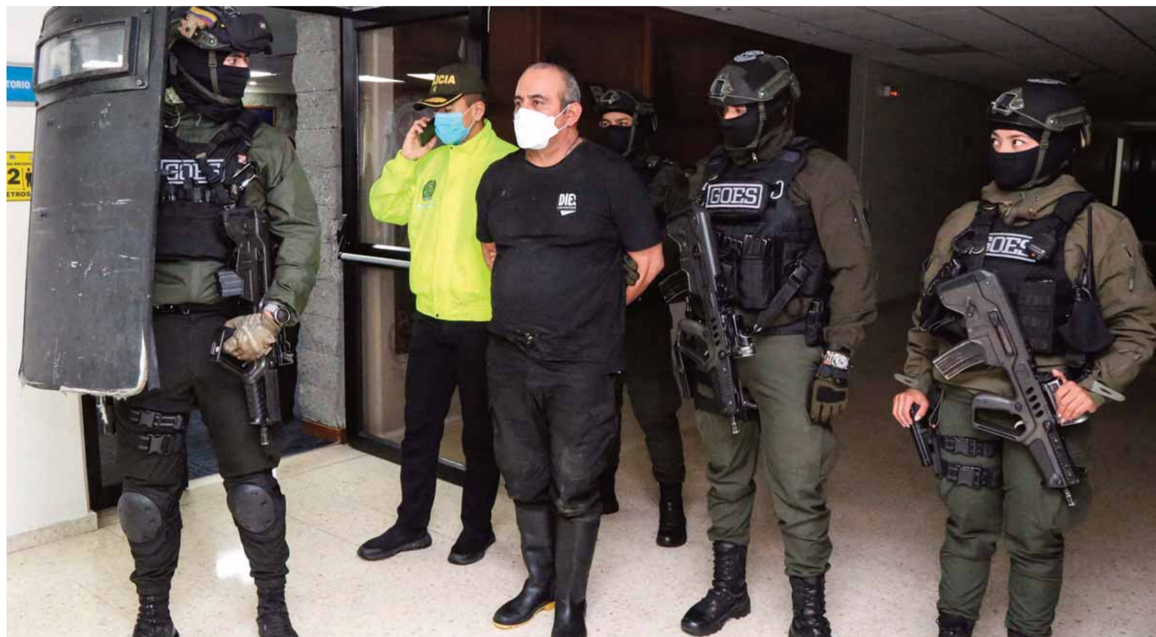
BOGOTA: Handout picture shows members of the Colombian Army escorting Colombia's most-wanted drug lord and head of the Gulf Clan, Dairo Antonio Usuga (center) - alias 'Otoniel' -, after his capture in Bogota.