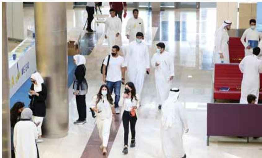
KUWAIT: (Left) Students arrive to attend classes at Kuwait University for the first time in a year and a half after coronavirus restrictions were lifted yesterday. (Right) Passengers are seen at Kuwait International Airport after it resumed operations at full capacity yesterday.

JERUSALEM: The Zionist entity yesterday announced plans to build more residences for Zionist settlers in the occupied West Bank, drawing immediate condemnation from Palestinians, peace activists and neighboring Jordan. The announcement from the housing and construction ministry in rightwing Prime Minister Naftali Bennett's government said tenders had been published for 1,355 homes in the West Bank, which has been occupied by the Zionist entity since the 1967 Six-Day War. — AFP