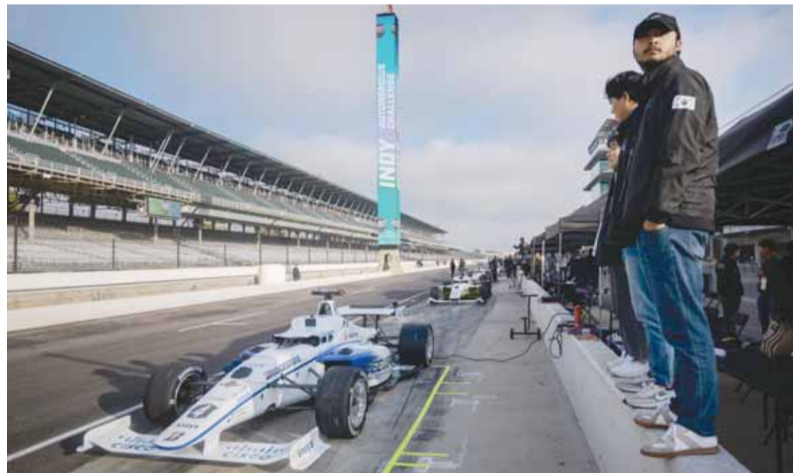
INDIANAPOLIS: Team members of the Korea Advanced Institute of Science and Technology (KAIST) stand before their car prior to the Indy Autonomous Challenge race at the Indianapolis Speedway in Indianapolis on Saturday.

Among the tech installed in the vehicles are sensors supplied by industry trailblazer Luminar that can map out surfaces from 250 meters away. The