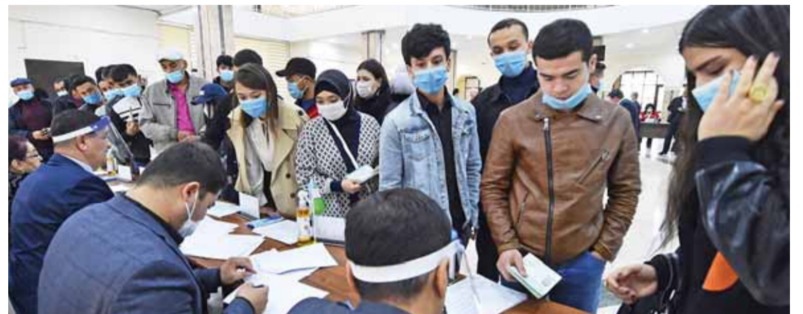
TASHKENT: People queue at a polling station to vote during Uzbekistan's presidential election in Tashkent yesterday.