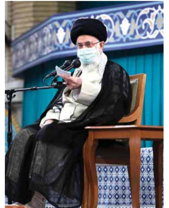
TEHRAN: A handout picture provided by the official website of Iran's Supreme Leader Ayatollah Ali Khamenei, shows him during a meeting with participants in the Islamic Unity Conference in the capital Tehran yesterday. — AFP

Hualien, a scenic tourist hotspot, was struck by a 6.4-magnitude earthquake in 2018 that killed 17 people and injured nearly 300. In September 1999, a 7.6-magnitude quake killed around 2,400 people in the deadliest natural disaster in the island's history. However, a 6.2-magnitude earthquake struck in December 2020 in Yilan with no major damage or injuries reported. — AFP