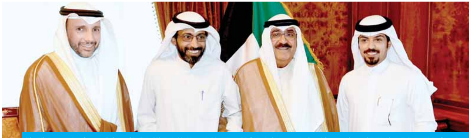
His Highness the Crown Prince Sheikh Mishal Al-Ahmad Al-Jaber Al-Sabah is seen during his meeting with National Assembly Speaker Marzouq Al-Ghanem and MP Dr Obaid Al-Wasmi.

Ahmad Nasser Al-Mohammad Al-Sabah and the Interior Minister Sheikh Thamer Ali Sabah Al-Salem Al-Sabah. His Highness the Amir received Deputy Prime Minister and Justice Minister and Minister for Integrity Promotion Abdullah Yousef Al-Roumi. His Highness the Crown Prince also met with Ghanem, His Highness Sheikh Sabah Al-Khaled and MP Wasmi. Furthermore, His Highness Sheikh Mishal received ministers Sheikh Hamad Jaber Al-Ali, Sheikh Dr Ahmad Nasser Al-Mohammad, Sheikh Thamer Ali Sabah Al-Salem and Roumi.