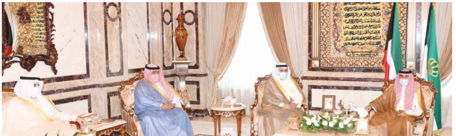
His Highness the Amir Sheikh Nawaf Al-Ahmad Al-Jaber Al-Sabah meets ministers of defense Sheikh Hamad Jaber Al-Ali Al-Sabah, interior Sheikh Thamer Ali Sabah Al-Salem Al-Sabah and foreign affairs Sheikh Dr Ahmad Nasser Al-Mohammad Al-Sabah.