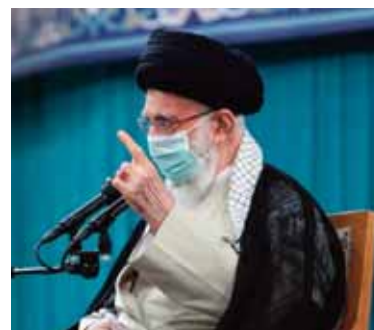
Iran's Khamenei urges reversal of Arab-Zionist normalizations