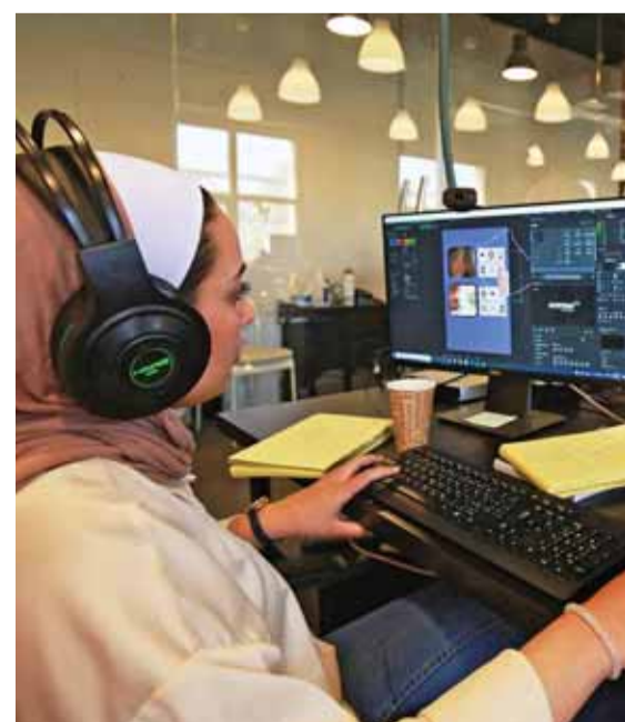
A developer is pictured at her desk at the offices of Tamatem.