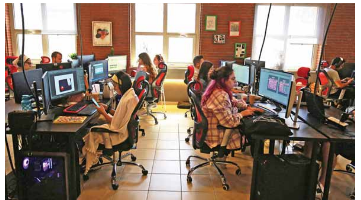
Developers are pictured at the office of Tamatem.