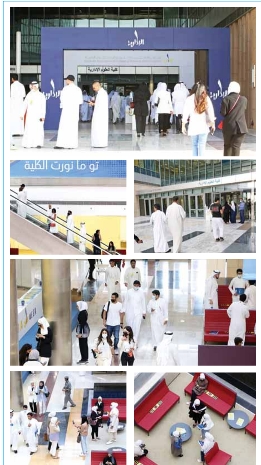
KUWAIT: Kuwait University facilities welcomed yesterday around 36,000 enrolled students who returned to campus after a year and half break due to COVID-19 precautionary measures.

"Our role in Kuwait is to integrate with Saudi Arabia in this regard, and we will