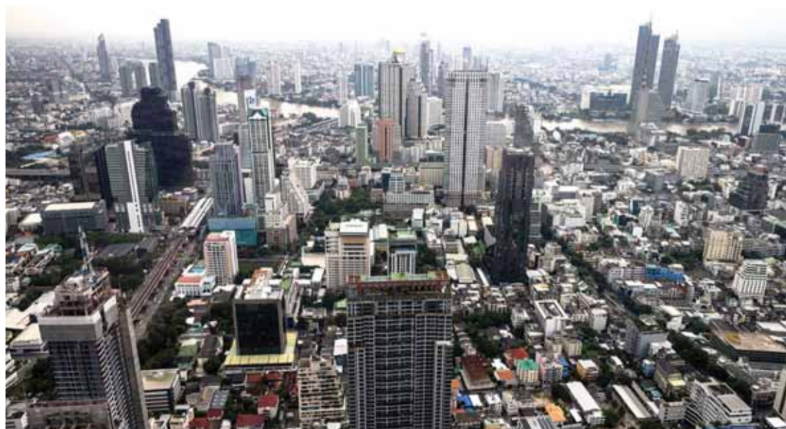
BANGKOK: This general view shows the Bangkok skyline, taken from the King Power Mahanakhon skyscraper in Bangkok.

Draconian travel curbs imposed to fight the coronavirus have battered the economy in Thailand, where tourism accounted for nearly 20 percent of national income pre-pandemic. Visitor numbers have collapsed from nearly 40 million a year to a trickle, leaving the hospitality industry struggling to survive.