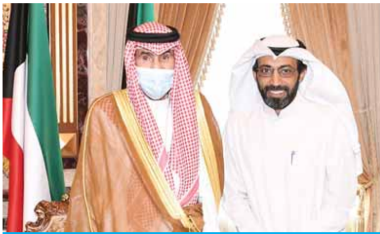
His Highness the Amir Sheikh Nawaf Al-Ahmad Al-Jaber Al-Sabah meets MP Dr Obaid Al-Wasmi.