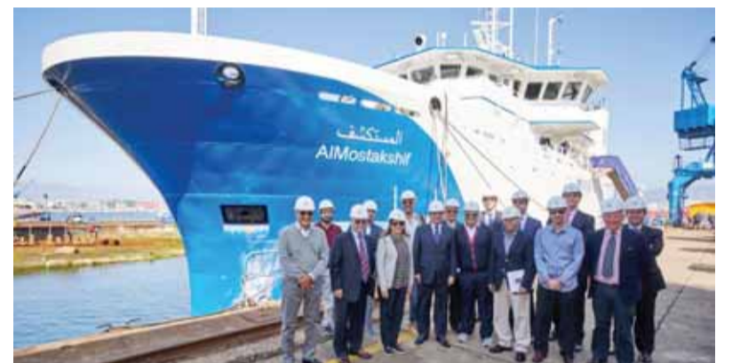
KUWAIT: Al-Mostakshif multipurpose vessel.

Al-Mostakshif and Bahith 1 will have regional and international significance, with many objectives, including conservation of food security, biodiversity, environment resilience, and