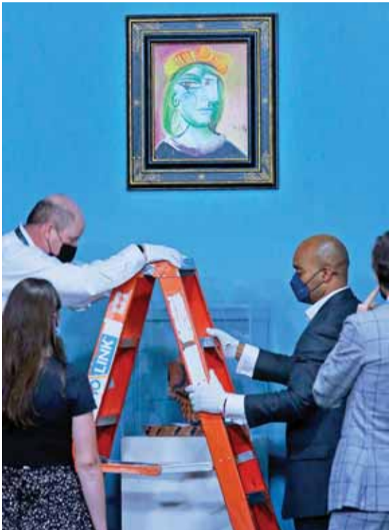
Staff position Spanish artist Pablo Picasso's 'Femme au beret rouge-orange' before the start of a Sotheby's auction.