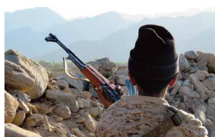
MARIB: A fighter loyal to Yemen's Saudi-backed government mans a position at the frontline facing Iran-backed Houthi rebels in the country's northeastern province of Marib.

RIYADH: The Saudi-led coalition fighting in Yemen said yesterday it had killed more than 260 Houthi rebels in the past three days near the strategic city of Marib. "Thirty-six military vehicles were destroyed and more than 264" rebel fighters were killed in strikes in the past 72 hours in Al-Jawba, some 50 kilometers south of Marib, and Al-Kassara, 30 kilometers to the northwest, the coalition said, quoted by the Saudi Press Agency. The Iran-backed Houthis rarely comment on losses, and AFP could not independently verify the toll. The coalition has for the past two weeks reported almost daily strikes around Marib, the