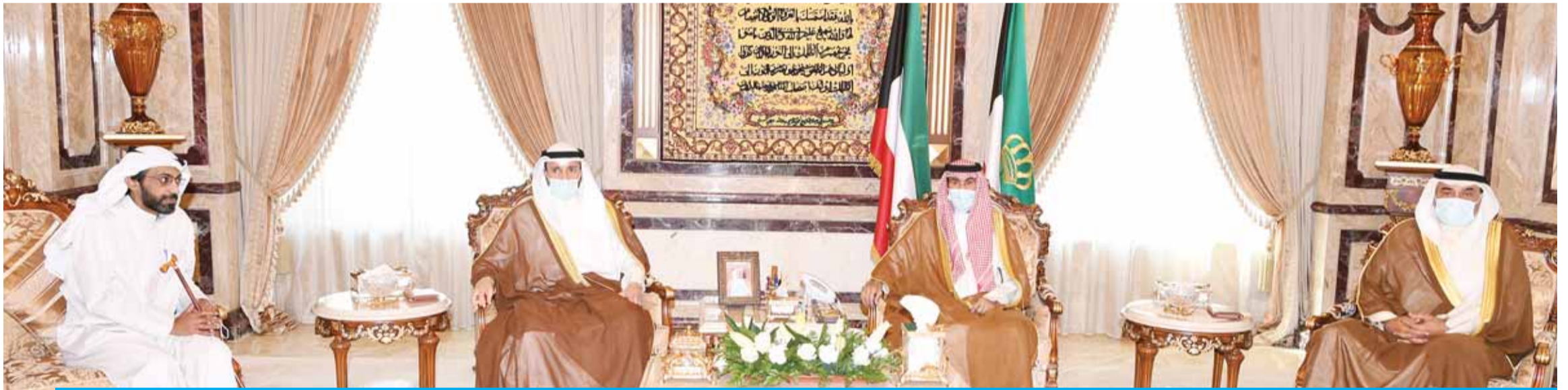
KUWAIT: HH the Amir Sheikh Nawaf Al-Ahmad Al-Jaber Al-Sabah receives National Assembly Speaker Marzouq Al-Ghanem, HH the Prime Minister Sheikh Sabah Al-Khaled Al-Hamad Al-Sabah and MP Obaid Al-Wasmi at Dar Al-Yamama yesterday.

Assembly to open tomorrow • Panel approves civil rights for bedoons