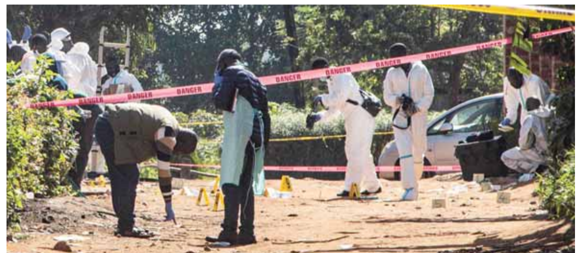
KAMPALA: Ugandan police officers investigate at a crime scene following a bomb blast last night in Kampala yesterday. Ugandan President Yoweri Museveni said that an explosion in the capital Kampala was 'a terrorist act' and vowed to hunt down those responsible.