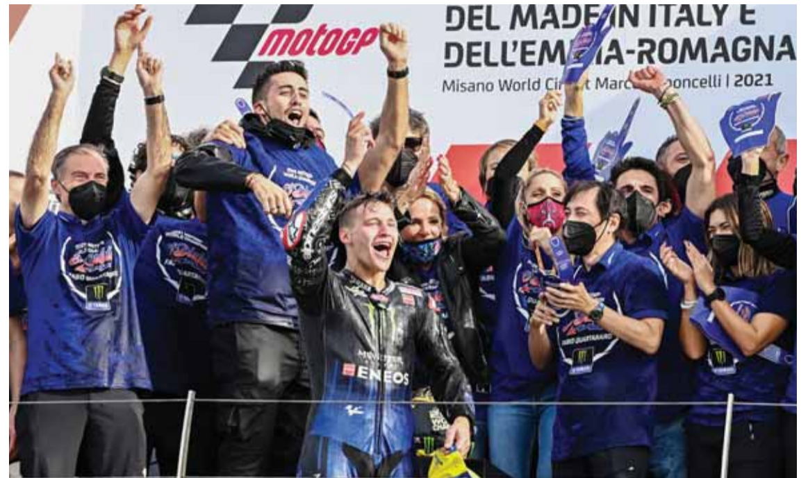
MISANO ADRIATICO, Italy: Yamaha French rider Fabio Quartararo (center) celebrates his world champion title on the podium yesterday after the Emilia-Romagna MotoGP Grand Prix at the Misano World Circuit Marco Simoncelli in Misano Adriatico, Italy.