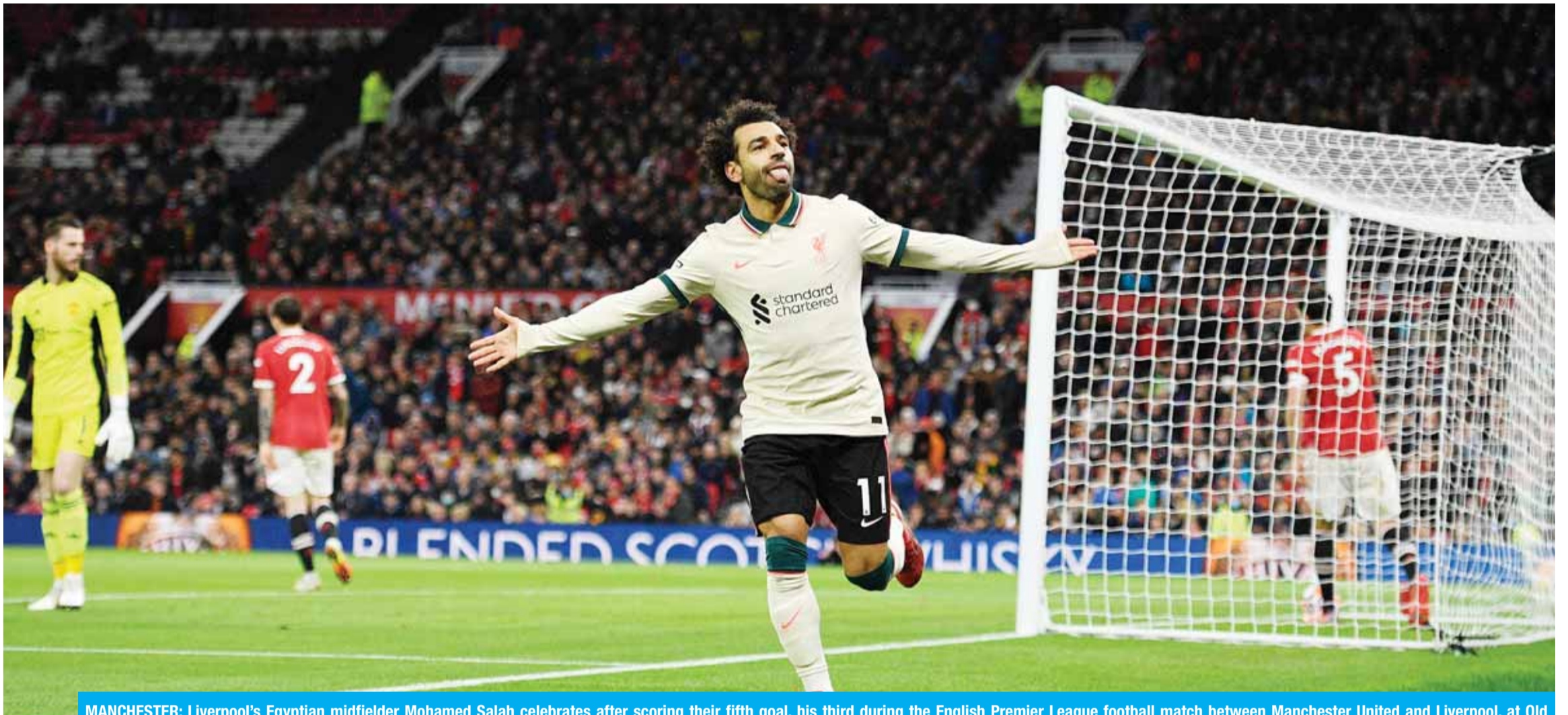
MANCHESTER: Liverpool's Egyptian midfielder Mohamed Salah celebrates after scoring their fifth goal, his third during the English Premier League football match between Manchester United and Liverpool, at Old Trafford yesterday.

Salah hits hat-trick in 5-0 rout • West Ham rock Spurs