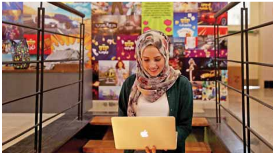
A developer is pictured at the offices of Tamatem.