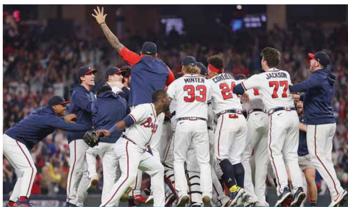
ATLANTA: Members of the Atlanta Braves celebrate after defeating the Los Angeles Dodgers in Game Six of the National League Championship Series at Truist Park on Saturday in Atlanta, Georgia.

Scherzer gave up two runs over four innings of game two last week and said that his arm was too sore to pitch in game six. The Dodgers instead had to turn to Buehler on short rest. Buehler was initially scheduled to start a potential game seven yesterday.