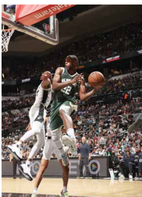
SAN ANTONIO: Khris Middleton #22 of the Milwaukee Bucks passes in the game against the San Antonio Spurs on Saturday at AT&T Center in San Antonio, Texas.

In Toronto, Luka Doncic compiled 27 points, 12 assists and nine rebounds as the visiting Dallas Mavericks defeated the Toronto Raptors 103-95. Tim Hardaway added 25 points for the Mavericks, who won for the first time this season after losing their opener Thursday in Atlanta.