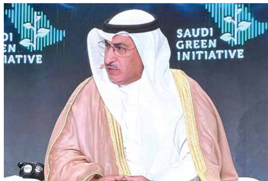
RIYADH: Kuwait's Oil Minister Dr Mohammad Al-Fares speaks during his participation in the Saudi Green Initiative forum.