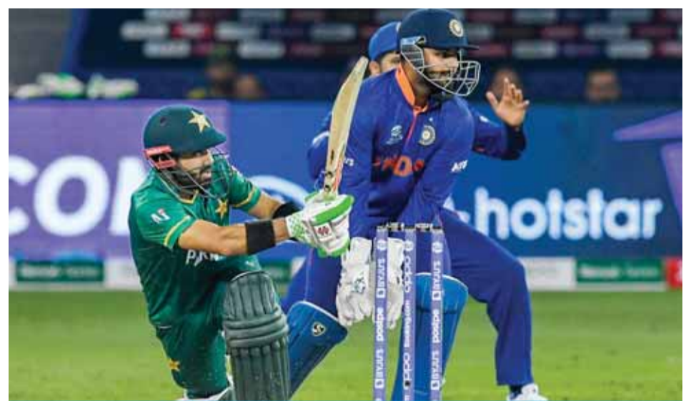
DUBAI: Pakistan's Mohammad Rizwan plays a shot during the ICC men's Twenty20 World Cup cricket match between India and Pakistan at the Dubai International Cricket Stadium yesterday.

Afridi struck the first blow with an express delivery that swung in to trap Rohit Sharma lbw for a first ball duck and the bowler cele-