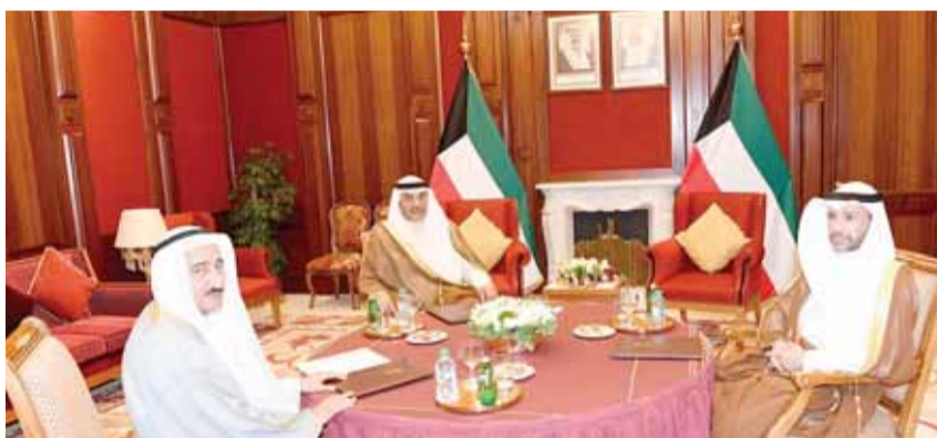
National Assembly Speaker Marzouq Al-Ghanem, HH the Prime Minister Sheikh Sabah Al-Khaled Al-Hamad Al-Sabah and Chairman of the Supreme Judicial Council and head of the Court of Cassation Ahmad Al-Ajeel meet at Bayan Palace yesterday upon the instructions of HH the Amir.