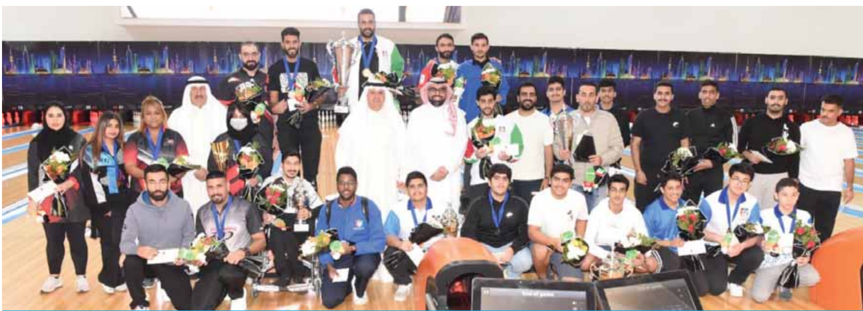
KUWAIT: A group photo of the winners at the conclusion of the tournament.