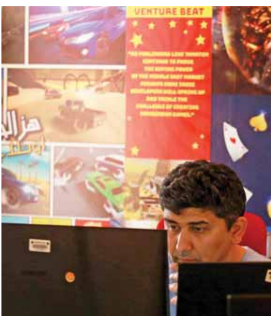
A developer is pictured at his desk at the offices of Tamatem.

She recalled how after the Beirut port explosion in August 2020, she and other gamers voiced their solidarity with Lebanese players. "So it is more than just a game," she said. — AFP