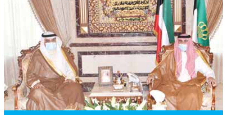
His Highness the Amir Sheikh Nawaf Al-Ahmad Al-Jaber Al-Sabah meets His Highness the Prime Minister Sheikh Sabah Al-Khaled Al-Hamad Al-Sabah.