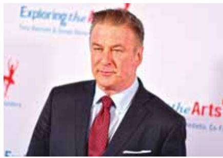
In this file photo actor Alec Baldwin attends the 'Exploring the Arts' 20th anniversary Gala at Hammerstein Ballroom in New York City.

The accident took place roughly midway through the filming of a low-budget