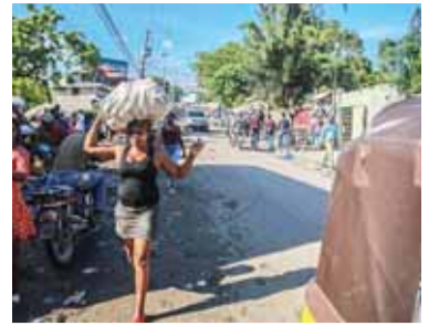
Growing in numbers and power, criminal gangs terrorize Haiti