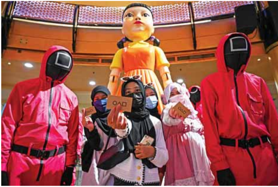
Shoppers takes picture with cosplayers dressed in outfits from the Netflix series "Squid Game" at a shopping mall in Kuala Lumpur yesterday.

After rolling out a lighter-than-normal slate of content in the first half of this year due to COVID-related production delays, Netflix said it was finishing the year with "what we expect to be our strongest Q4 content offering yet." "Our programming strategy is to provide members with a wide variety of high quality content that's loved and watched in large numbers," it said in a statement. New seasons of original Netflix series Money Heist and Sex Education were the biggest returning shows, viewed by 69 million and 55 million households respectively, according to