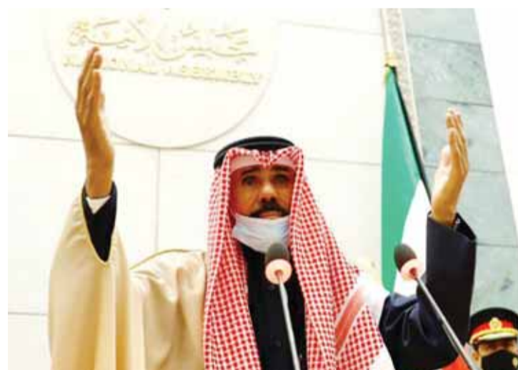
HH the Amir Sheikh Nawaf Al-Ahmad Al-Jaber Al-Sabah

The panel which will propose the pardon rules comprises of National Assembly Speaker Marzouq Al-Ghanem, HH the Prime Minister Sheikh Sabah Al-Khaled Al-Sabah and head of the judicial authority Ahmad Al-Ajeel. The Amiri order gave no timeline for the panel to complete its work. The Amiri Diwan said in a statement that the decision was taken after HH the Amir was briefed on the outcome of the national dialogue by the