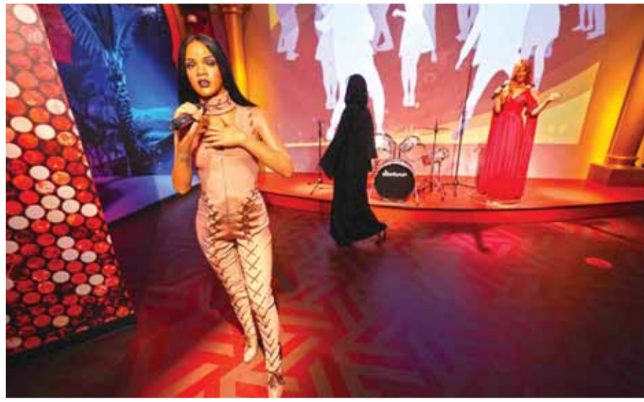
A waxwork of Barbadian singer Rihanna.