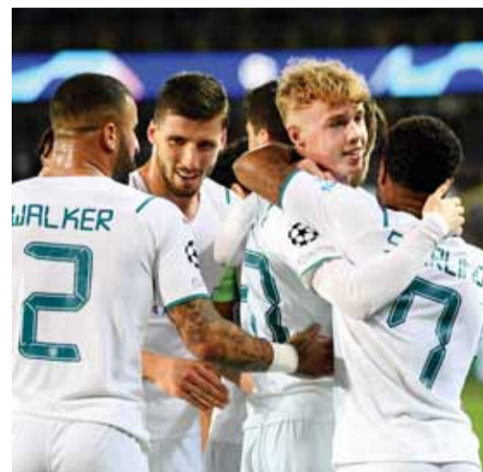
BRUGES: Manchester City's Cole Palmer (center) celebrates with teammates after scoring a goal during their team's UEFA Champions League first round day 3 Group A football match against Club Brugge at the Jan Breydel stadium in Bruges on Tuesday.

While City's spending power is almost unparalleled, and often questioned by rivals, the club is showing it can nurture talent as well as compete financially for any player on the market. Foden had