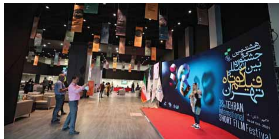
Iranians arrive for the opening day of the 38th Tehran International Short Film Festival (TISFF) in the Iranian capital.

"Imagine three years from now some future Squid Game is launching and it comes along with an incredible array of interactive or gaming options that is all built into the service," Netflix chief Reed Hastings said on an earnings call. "A company like Disney is still ahead of us in some of those dimensions of putting that whole experience together but boy are we making progress." — AFP