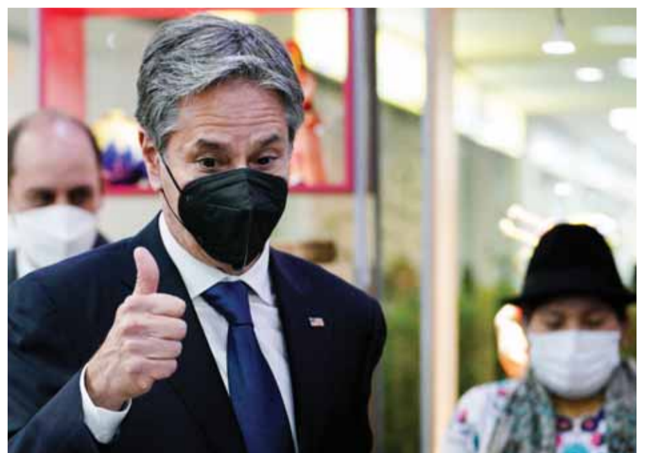
QUITO: US Secretary of State Antony Blinken gives his thumb up during a visit to the Camari market centre, where local artisans and farmers exhibit their products, in Quito.

In Ecuador, which has received billions of dollars in Chinese loans to fund electricity, oil and other projects, Blinken