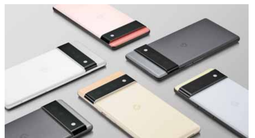
The new Google smartphone, Pixel 6, is displayed. Google on October 19, 2021 debuted its flagship Pixel 6 smartphones, the latest effort in a market the tech giant has failed to conquer. — AFP

Samsung uses Google-backed Android software to power phones, offering handsets at a wide variety of prices. Apple has consistently aimed iPhones at the high-end of the market, controlling the hardware and software so tightly it has raised antitrust concerns. "We have state-of-the-art hardware, which means Pixel can deliver even more impressive real-world performance, as well as new