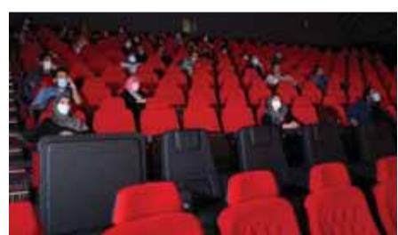
Iranians watch a movie in the opening day of the 38th Tehran International Short Film Festival (TISFF).

Tehran's International Short Film Festival opened this week, for the first time as an Oscar-qualifying event, giving winning entries a shot at an Academy Award. The festival jury has members from the Islamic republic as well as Italy, Japan, France and Austria. The festival, now in its 38th edition and running until Sunday, earned qualification this year as a gateway to Hollywood's annual awards showcase. The event