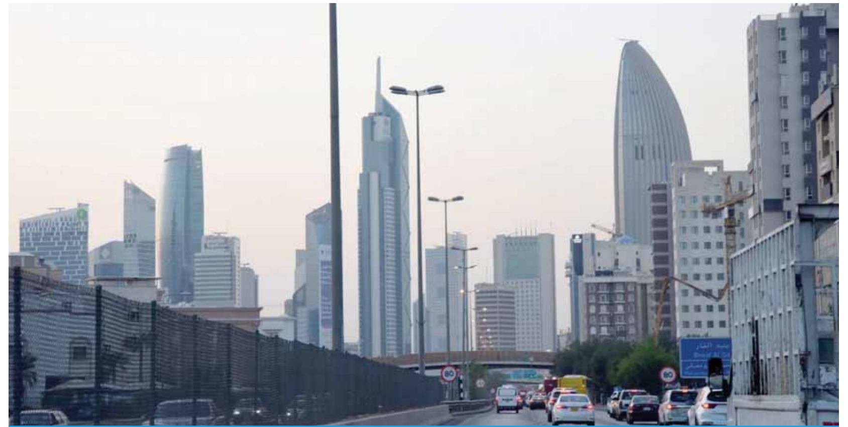
KUWAIT: Vehicles drive towards Kuwait City at sunset.