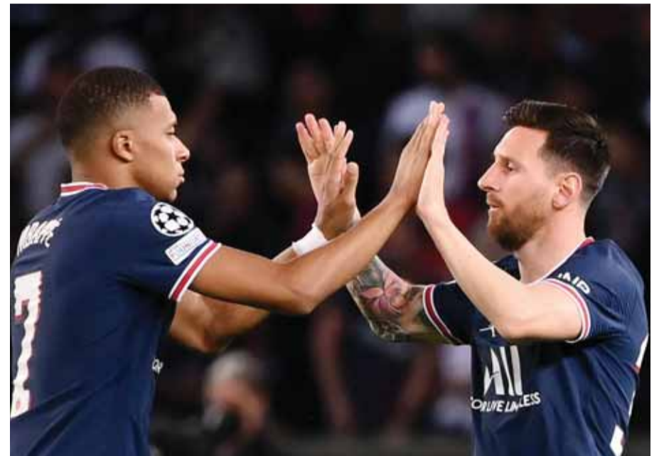
PARIS: Paris Saint-Germain's Kylian Mbappe (left) greets teammate Lionel Messi during their team's UEFA Champions League first round group A football match against Leipzig at The Parc des Princes stadium, in Paris, on Tuesday.

At the Parc des Princes, Messi scored twice and Kylian Mbappe sparked but later missed a penalty as PSG came from behind to beat RB Leipzig 3-2. Mbappe