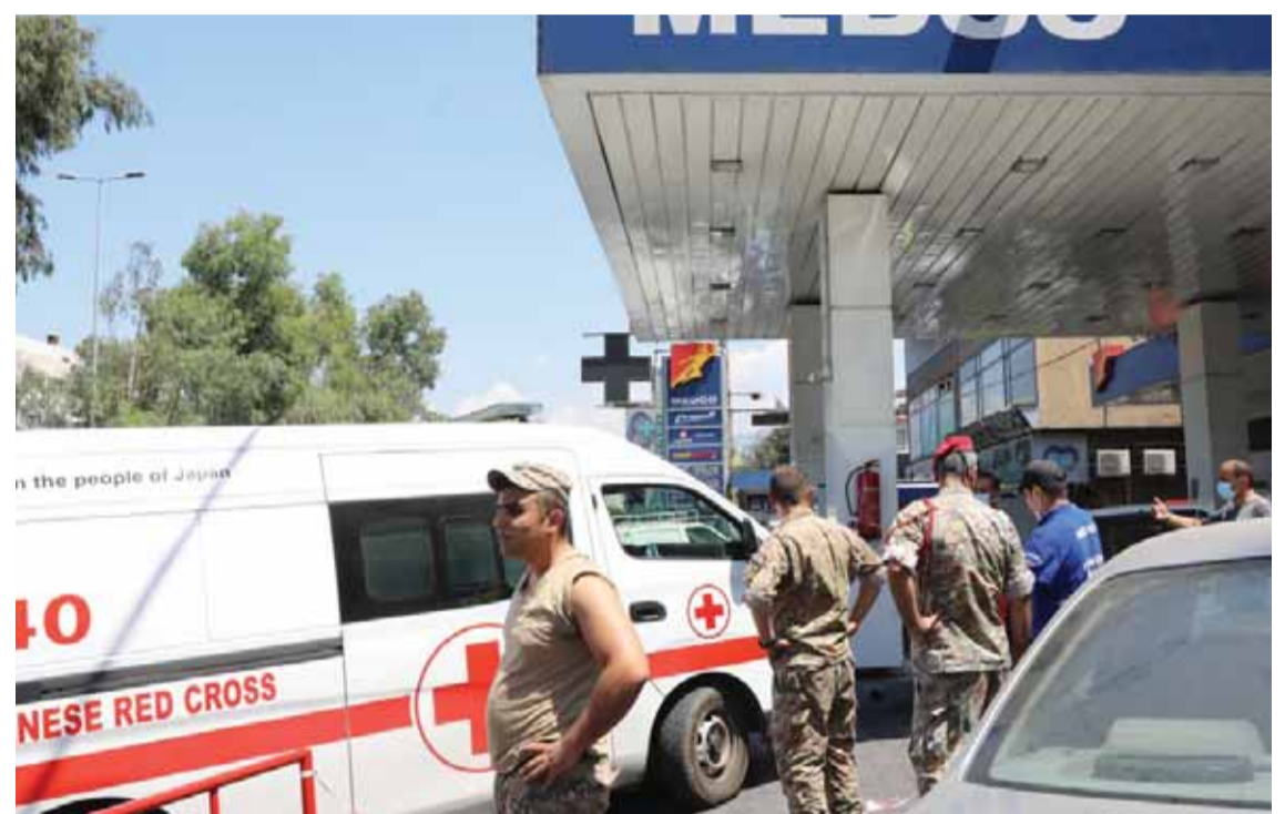
BEIRUT: Lebanon raised fuel prices yesterday in a de facto end to state subsidies, pushing the cost of filling a vehicle's tank to more than the monthly minimum wage in the poverty-stricken nation.

The contract with A&M was signed by Finance Minister Youssef Khalil last month only days after he