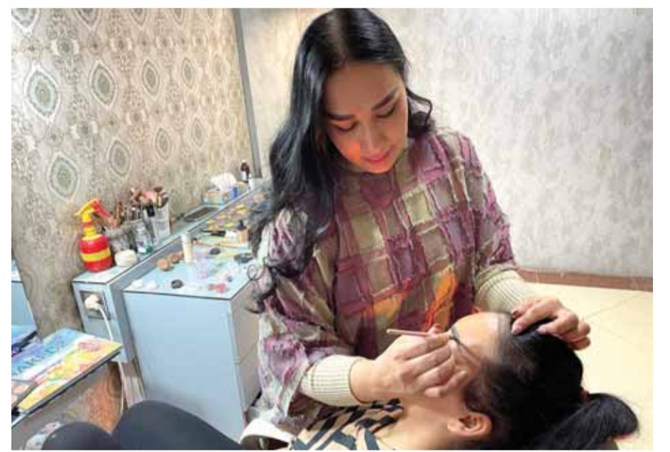
In this photograph, a beautician applies make-up to a customer at a beauty salon in Kabul.

The last time the Taliban ruled Afghanistan, between 1996 and the US-led intervention of 2001, women were