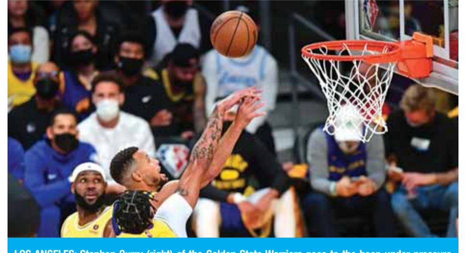
LOS ANGELES: Stephen Curry (right) of the Golden State Warriors goes to the hoop under pressure from Anthony Davis and LeBron James of the Los Angeles Lakers during their NBA season opener in Los Angeles, California on Tuesday.