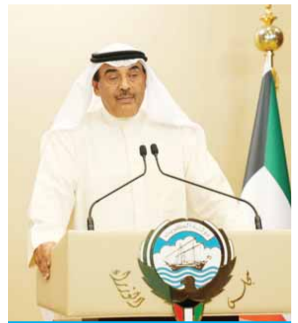
HH the Prime Minister Sheikh Sabah Al-Khaled Al-Sabah