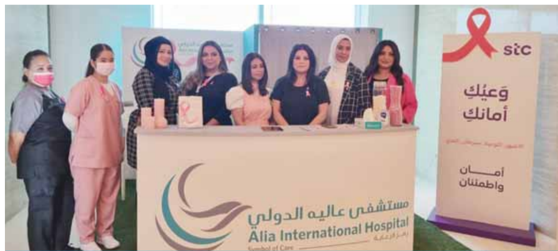
KUWAIT: Group photo at the Alia International Hospital stand at stc headquarters.

In terms of the initiatives under stc's internal campaign, the Company organized an event for female employees at REBEL Gym, the first smart kickboxing gym, with the aim of shedding light on the importance