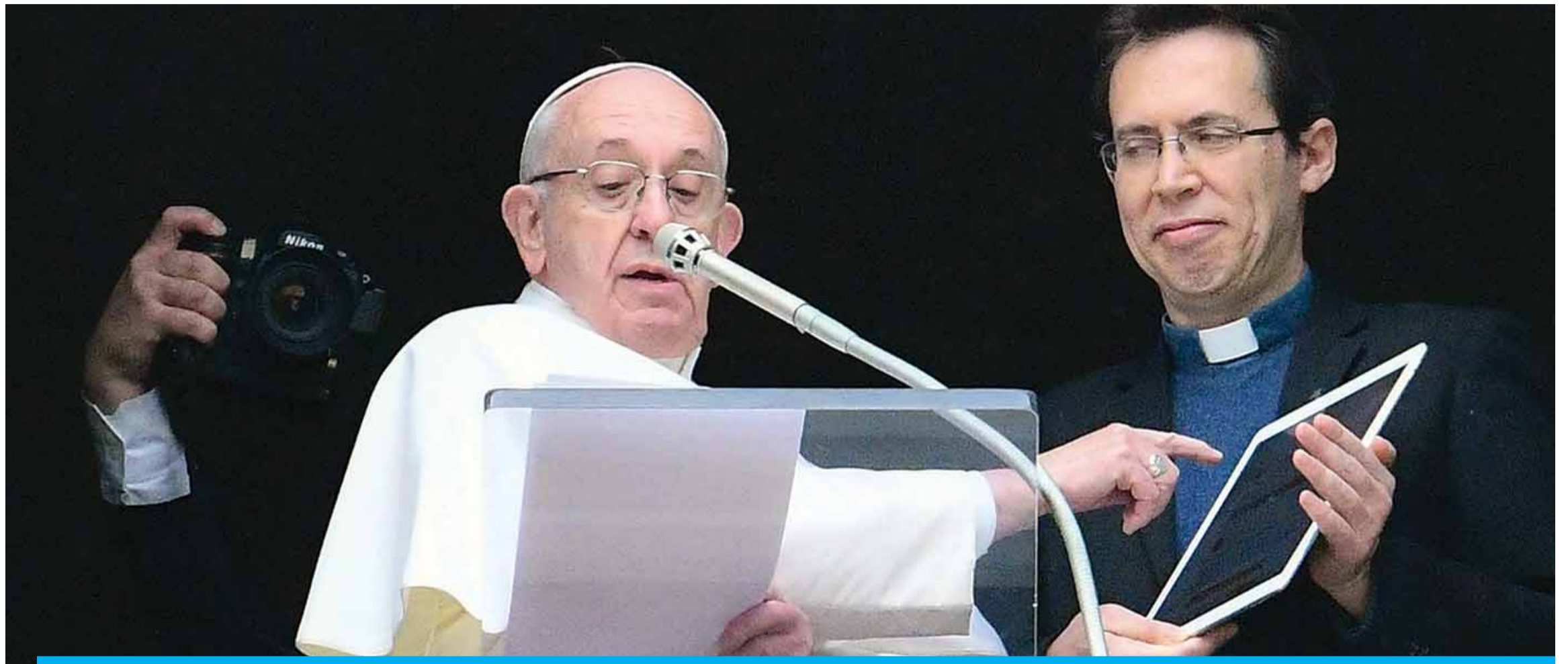
VATICAN CITY: Pope Francis points to a tablet computer as he invites the faithful to download the 'Click to Pray' app, from the window of the Apostolic Palace overlooking St Peter's square in the Vatican during the weekly Angelus prayer.