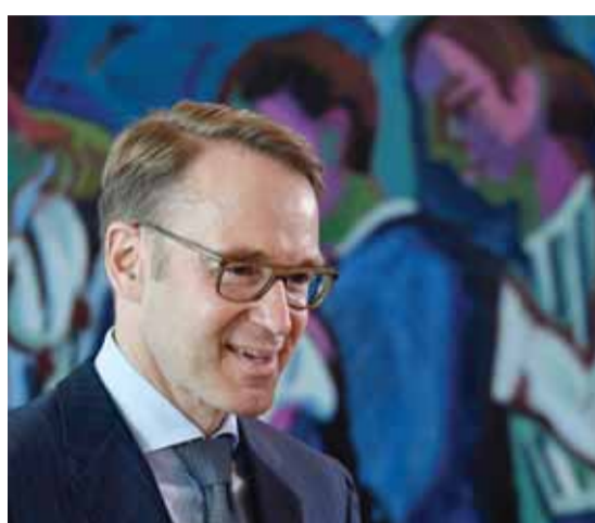
FRANKFURT: In this file photo, Jens Weidmann, president of the German Central Bank (Bundesbank), smiles as he arrives to attend the weekly cabinet meeting at the Chancellery in Berlin.

Among the parties taking part in talks, the liberal FDP has supported a more conservative direction for monetary policy than the Social Democrats and Greens. The next German govern-