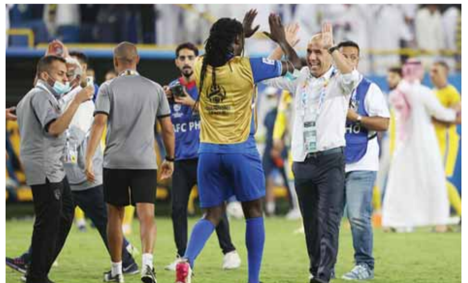
Hilal's forward Bafetimbi Gomis celebrates the win with Hilal's coach Leonardo Jardim during the AFC Champions League semifinal football match between KSA's Al-Nassr and KSA's Al-Hilal on Tuesday, at the Mrsool Park Stadium in Riyadh.