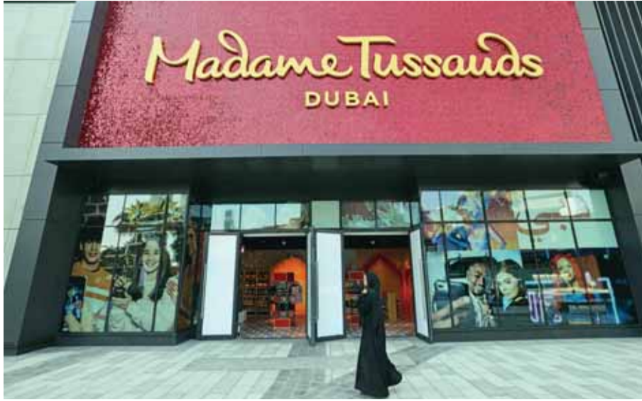
A picture shows the newly opened Madame Tussauds museum in Dubai.