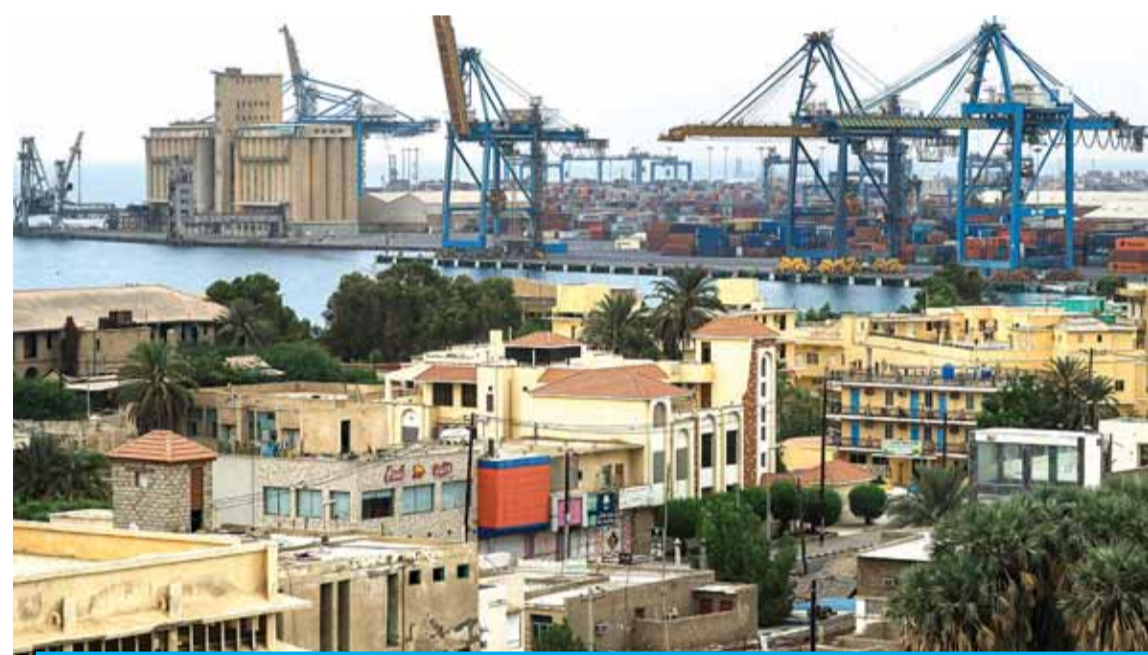
PORT SUDAN: Photo shows an elevated view of the southern port of Port Sudan along the Red Sea in the country's northeast, with the Agricultural Bank of Sudan Grain Silos (left).