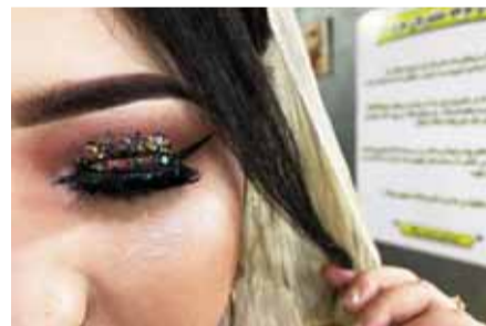
A customer shows her make-up done by a beautician at a beauty salon in Kabul.