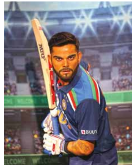
A waxwork of Indian cricket player Virat Kohli.