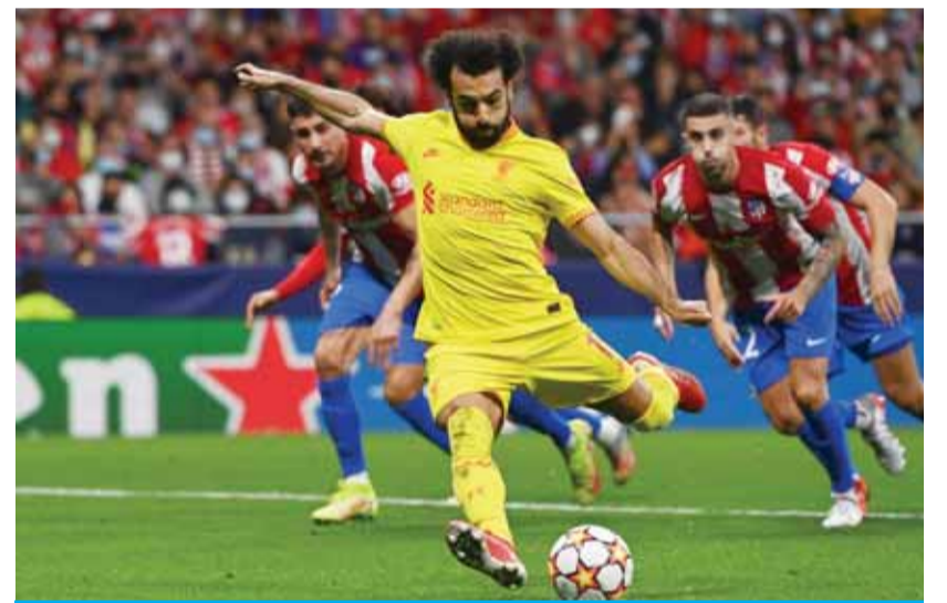
MADRID: Liverpool's Egyptian forward Mohamed Salah shoots and scores a penalty kick during the UEFA Champions League Group B football match between Atletico Madrid and Liverpool at the Wanda Metropolitano stadium in Madrid on Tuesday.

history for Salah as he surpassed Steven Gerrard as the club's highest scorer in the Champions League, with his two goals taking him to a tally of 31. He is also the first player to score in nine consecutive matches