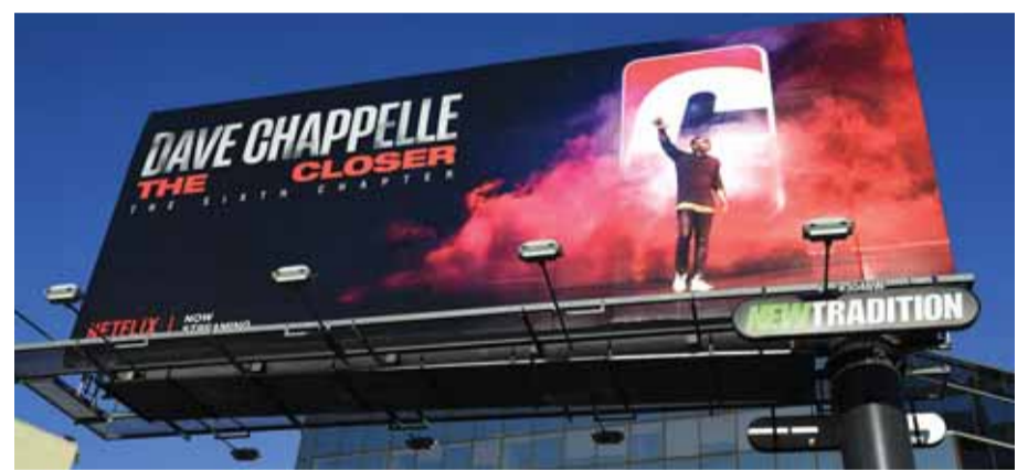
A billboard for the Dave Chappelle Netflix special "The Closer" is seen in Hollywood, California.

The walkout and rally have drawn support from film and television celebrities such as Jameela Jamil ("The Good Place") and Jonathan Van Ness ("Queer Eye"), who have recorded a video message expressing "love and support" for the movement. Acclaimed comedian Hannah Gadsby-who has her own popular Netflix specials-last week called the streaming giant an "amoral algorithm cult."