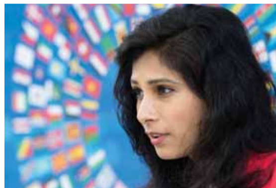
WASHINGTON, US: Gita Gopinath, the Chief Economist of the International Monetary Fund, speaks during an IMF conference.

She had a key role in setting global vaccination targets to end the COVID-19 pandemic, and also helped set up a Climate Change team inside the IMF to analyze, among other things, optimal climate mitigation policies, Georgieva said. Gopinath's decision