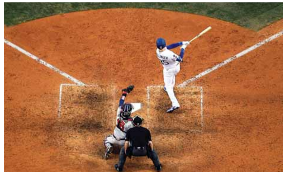
LOS ANGELES: Cody Bellinger #35 of the Los Angeles Dodgers hits a 3-run home run during the 8th inning of Game 3 of the National League Championship Series against the Atlanta Braves at Dodger Stadium on Tuesday in Los Angeles, California.

"We were dead in the water. You could see it," Roberts added. "It just flipped everything. We needed that kind of shot in the arm." The Dodgers' victory left Atlanta