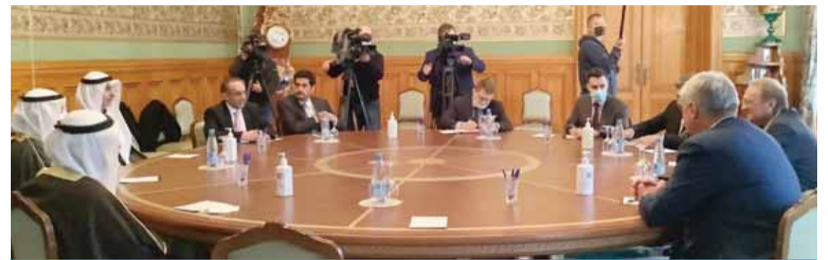
MOSCOW: Kuwait's Deputy Foreign Minister Majdi Al-Dhafiri (left) holds talks with Russian Deputy Foreign Minister and Presidential Special Envoy for the Middle East and Africa Mikhail Bogdanov.

MOSCOW: Russia expressed its desire to strengthen cooperation with the State of Kuwait in investment, economic and trade fields. This came in a statement yesterday by the Russian Foreign Ministry after the talks held between Kuwaiti Deputy Foreign Minister Ambassador Majdi Al-Dhafiri and the Russian President's Special Envoy to the Middle East and Deputy Foreign Minister Mikhail Bogdanov the previous day. The statement said that the two sides affirmed their common determination to enhance cooperation in the trade, economic and investment fields based on agreements previously reached at the highest levels. Furthermore, the statement noted that the talks touched on the developments in Syria, Iraq, Yemen and the Palestinian-Israeli settlement, stressing in this regard the importance of forming a system for