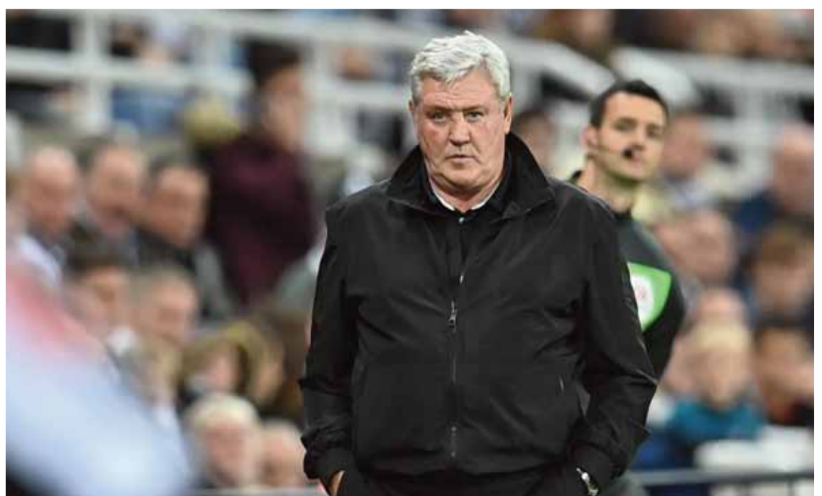
NEWCASTLE: Newcastle United's English head coach Steve Bruce looks on during the English Premier League football match between Newcastle United and Tottenham Hotspur at St James' Park in Newcastle-upon-Tyne, north east England on Sunday.

The £305 million ($420 million) Newcastle takeover was rubber-stamped by the Premier League earlier this month after it received legally binding assurances that the Saudi state would not control the club. Bruce was a deeply unpopular figure with the Newcastle supporters, in part due to his past as manager of northeast rivals Sunderland. A recent poll from the Newcastle United Supporters Trust found