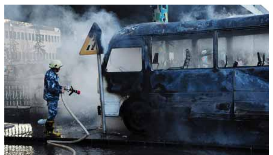
DAMASCUS: A firefighter puts out a blaze on a Syrian army bus that was targeted with explosive devices yesterday.