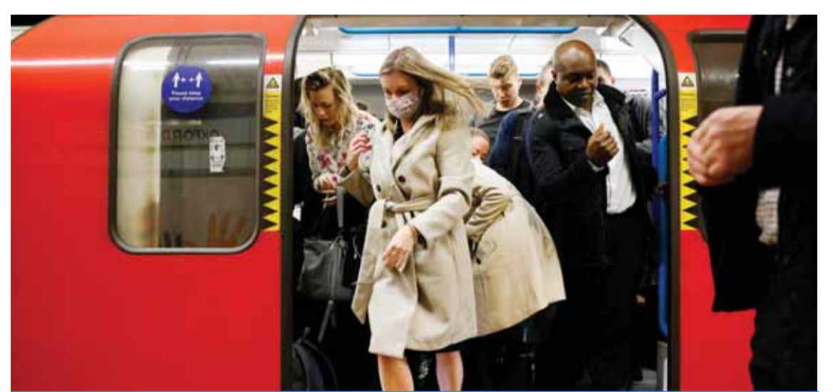
LONDON: Commuters, some wearing face coverings to help prevent the spread of coronavirus, walk out of a Transport for London (TfL) underground train in London yesterday.

Taylor said health leaders report the worsening Covid-19 situation means they are missing key targets in areas such as waits in emergency departments, ambulance response times and treatment backlogs. "Is it better to act early and take meas-