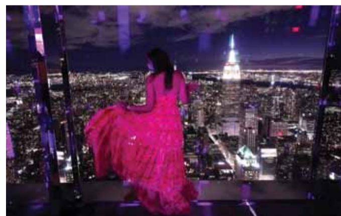
A woman poses as members of the media attend a press preview to experience SUMMIT by Night ahead of the grand opening of SUMMIT One Vanderbilt in New York.