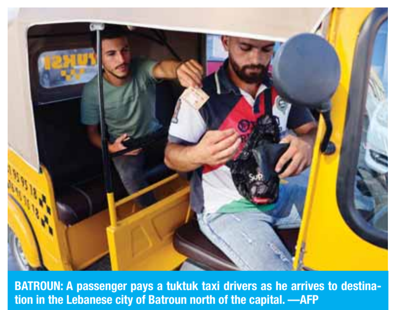
BATROUN: A passenger pays a tuk-tuk taxi drivers as he arrives to destination in the Lebanese city of Batroun north of the capital.