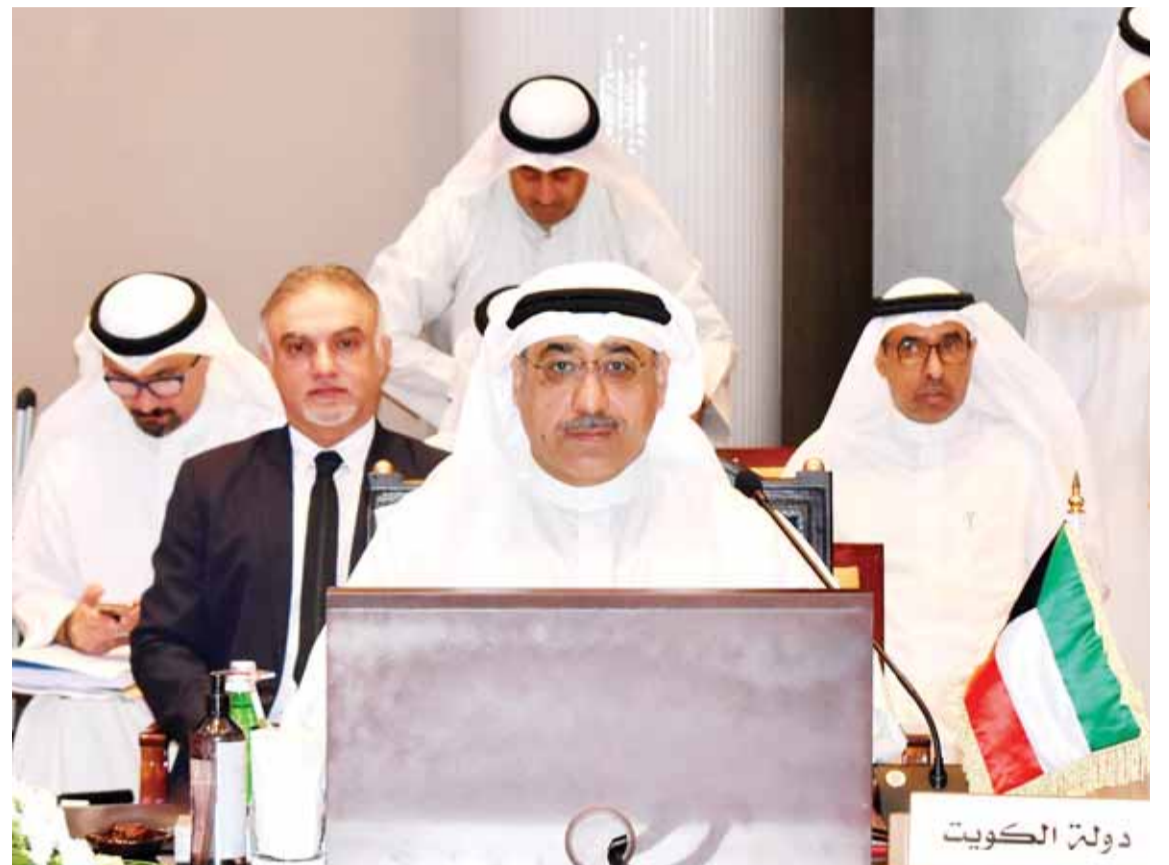
MANAMA: Kuwait's Minister of Commerce and Industry Dr Abdullah Al-Salman attends the GCC standardization organization meeting with the commercial collaboration committee between GCC ministers.

Meanwhile, Secretary-General of the Gulf Cooperation Council (GCC) Nayef Al-Hajraf said that the GCC Secretary is looking forward to further efforts to enhance cooperation amongst ministries of commerce and industry, and contribute to