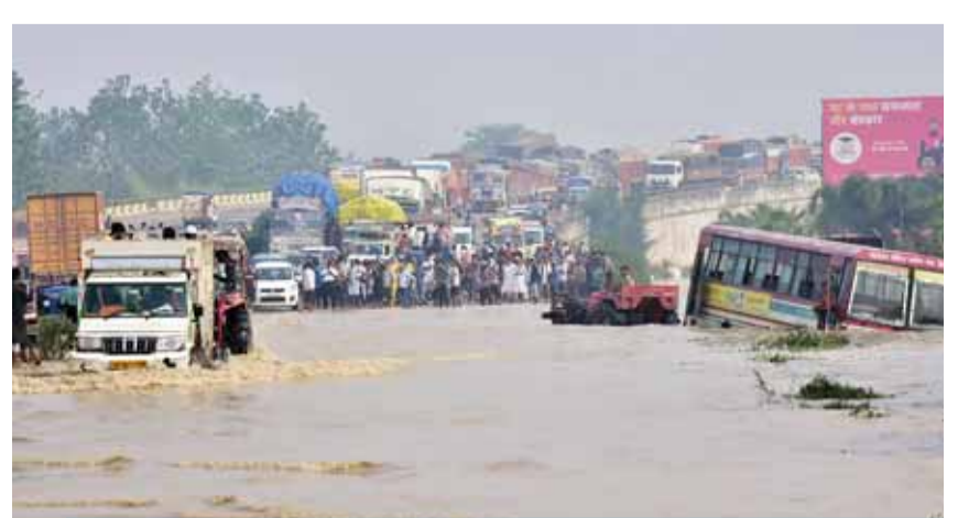
RAMPUR, India: Commuters stand on a flyover on a flooded national highway after the river Kosi overflowed following heavy rains in Uttar Pradesh state yesterday.