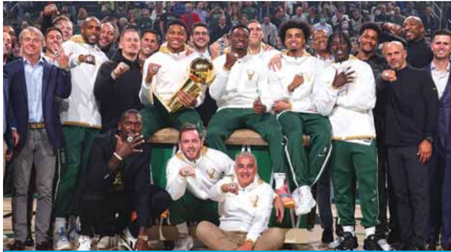
MILWAUKEE: The Milwaukee Bucks receive the 2021 NBA Championship ring before the game against the Brooklyn Nets on Tuesday at the Fiserv Forum Center in Milwaukee, Wisconsin.

LOS ANGELES: Giannis Antetokounmpo scored 32 points as the Milwaukee Bucks launched the defense of their NBA crown on Tuesday with a 127-104 victory over the Brooklyn Nets, as LeBron James and the Los Angeles Lakers were outgunned by the Golden State Warriors.