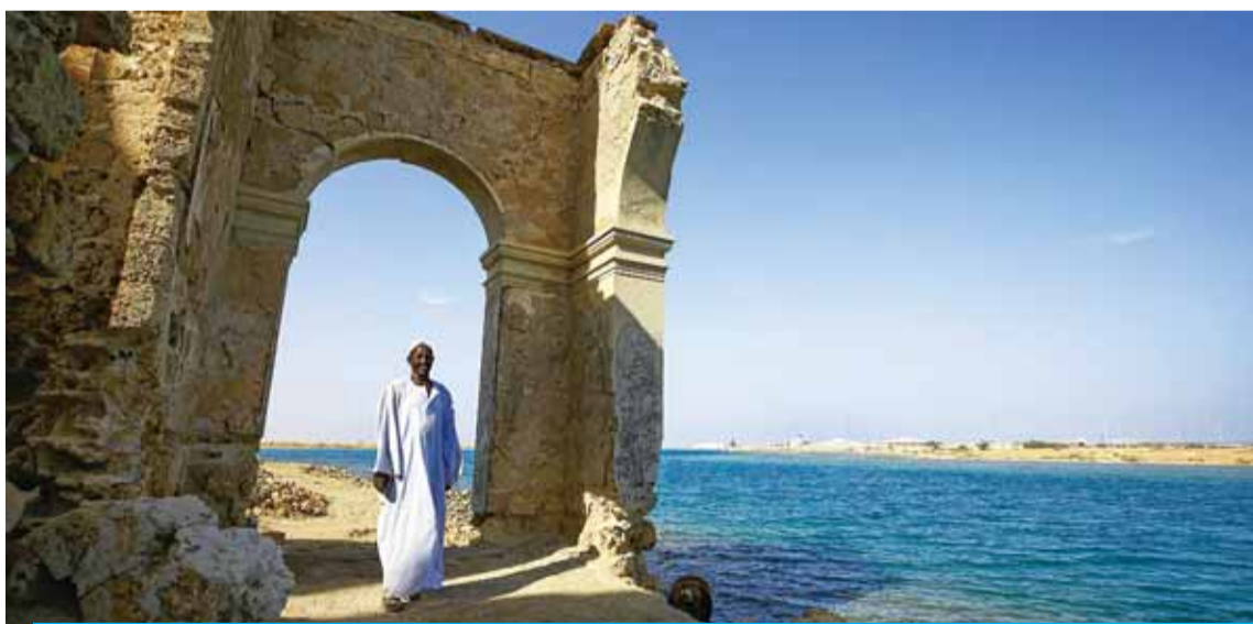
SAWAKIN: A Sudanese man walks beneath an arch at a dilapidated building in the abandoned ancient island of Suakin in eastern Sudan - home to spectacular buildings made of porous limestone quarried from coral reef.

For more than a decade under Bashir, the eastern communities were part of the armed struggle against his government protesting against economic neglect, marginalization and disenfranchisement. In late 2018, they joined nationwide demonstrations against Bashir's rule that eventually led to his ouster in April 2019. But in recent weeks, they have been among protesters blockading the country's main seaport in Port Sudan and a key route leading to Khartoum, severely straining the already struggling economy.