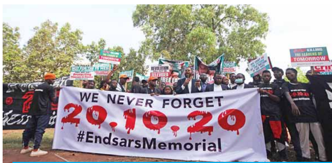
ABUJA: Protesters gather with placards in their hand, during a protest to commemorate one year anniversary of EndSars, a protest movement against police brutality at the Unity Fountain in Abuja yesterday.

Recent weeks have seen multiple warnings against more EndSARS protests by the authorities, who say they turned into rioting and pillaging last year. According to Amnesty, at least 56 people died nationwide during the weeks of protests in 2020. Police