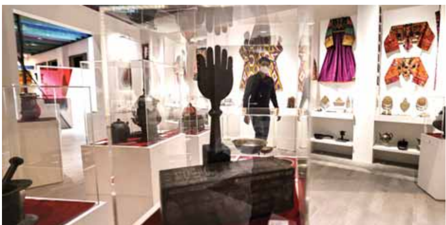
This picture shows a view of the pavilion of Afghanistan during the Expo 2020 in the Gulf Emirate of Dubai.