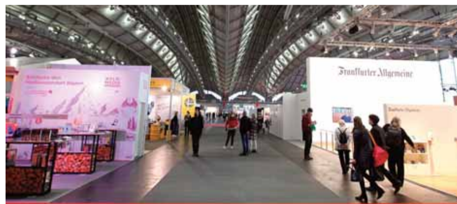
Visitors walk at booths at the Frankfurt Book Fair 2021 in Frankfurt am Main, Germany yesterday.