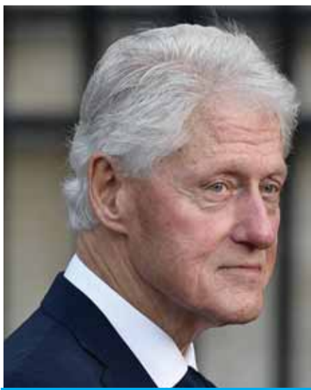
Former US President Bill Clinton

Bill Clinton meanwhile gave speeches, led his nonprofit, the Clinton Foundation, and helped raise money for the Democrats. In 2004 he published an autobiography, and in 2011 another volume on how to revive the economy. And since 2018 he has written two thrillers