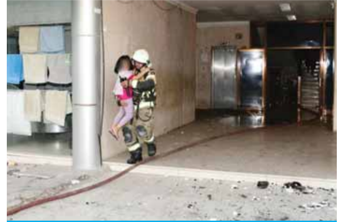
A fireman evacuates a child from a building in Riggae where a fire was reported.

KUWAIT: A man died and three others were injured in an accident reported yesterday at King Fahad Road. Firemen and paramedics rushed to the scene in response to an emergency call reporting a horrific crash on the road in front of Bayan Palace. One person was pronounced dead on the scene, while three others were rushed to hospital for treatment, Kuwait Fire Force (KFF) said in a press statement. An investigation was opened to reveal the cause of the accident. KFF had also reported a fatal accident on Sixth Ring Road which left one motorist dead. Firemen used special equipment to cut the wrecked car open and retrieve the victim's body from the vehicle, KFF noted.