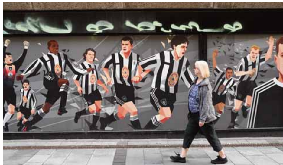
NEWCASTLE: A pedestrian passes a Newcastle United football club-themed mural in Newcastle upon Tyne in northeast England on October 8, 2021.

when Bruce's time in charge comes to an end. A recent poll from the Newcastle United Supporters Trust found that 94 percent of fans wanted him to resign. Bruce's continued presence is unlikely to sour a jubilant atmosphere among the fans.