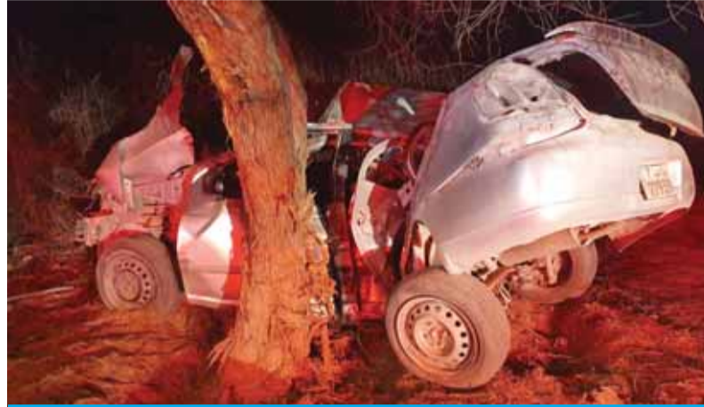
A handout photo released by Kuwait Fire Force shows a vehicle that was involved in a fatal crash on Sixth Ring Road.