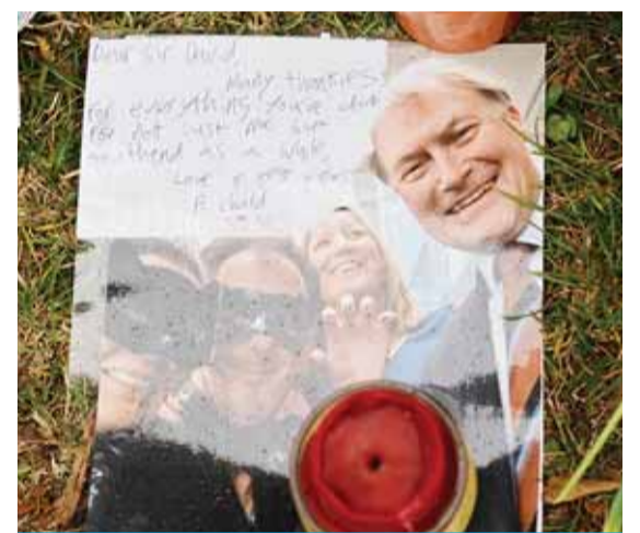
LEIGH-ON-SEA: A photograph of Conservative British lawmaker David Amess is seen yesterday among floral tributes left at the scene of his killing at Belfairs Methodist Church.

Local residents including members of the Muslim community also came, heaping bouquets next to the police tape. Britain's politicians were stunned by the highly public attack, which recalled the murder of a