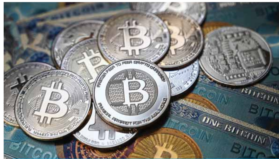
ISTANBUL: This illustration photograph shows a physical banknote and coin imitations of the Bitcoin crypto-currency.