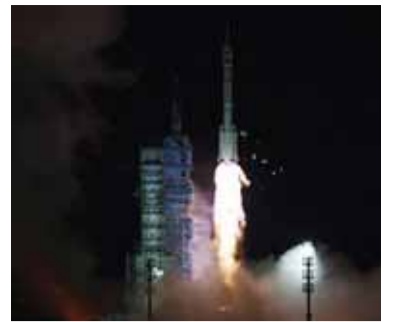
Chinese astronauts arrive at the station

Russia 'chased out' US navy ship from its waters