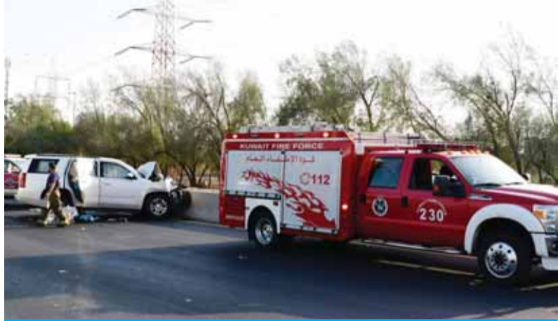
KUWAIT: A handout photo released by Kuwait Fire Force yesterday shows firemen at the site of a fatal accident on King Fahad Road.