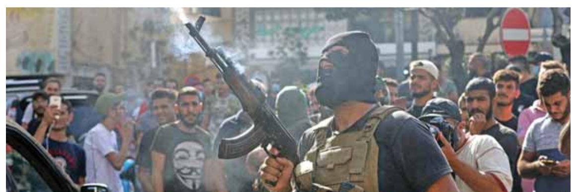
BEIRUT: A member of Lebanon's Hezbollah movement fires his gun during the funeral of some of their members who were killed during clashes in the Tayouneh neighborhood of the capital Beirut's southern suburbs.