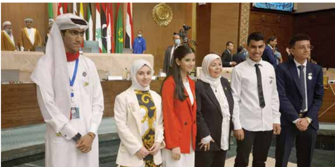
CAIRO: A scene from the honoring ceremony.

Parliament's firm support for the Palestinian cause, and that during a speech before the opening session of the third legislative term of the Arab Parliament. He noted that he addressed letters to the Secretary-General of the United Nations, the United Nations High Commissioner for Human Rights, the President of the Inter-Parliamentary Union, the heads of regional parliaments and the Director-General of (UNESCO) regarding the crimes and systematic violations of the occupying forces in Al-Aqsa Mosque.