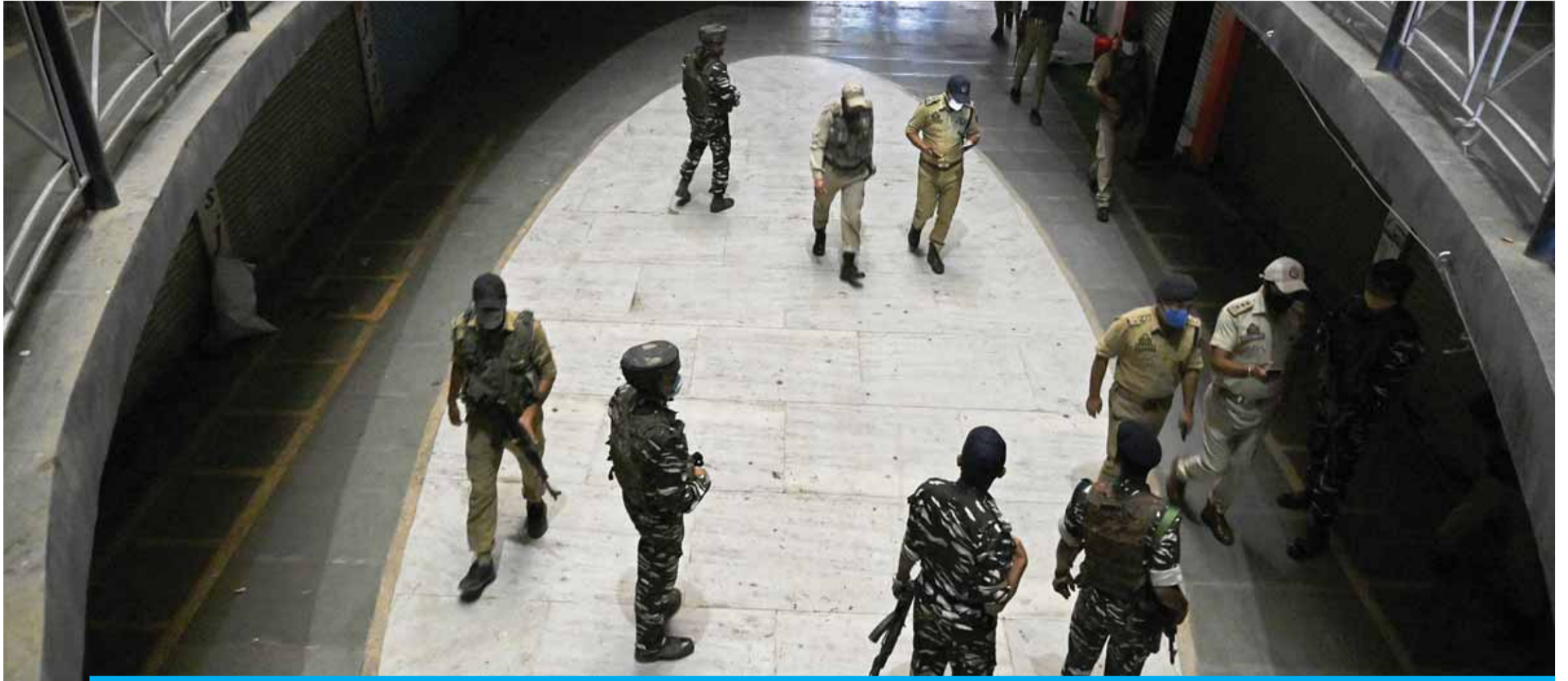
SRINAGAR: Indian security personnel stand guard in this file photo, near the site where a man was shot dead by unknown gunmen in the Karanagar area of downtown Srinagar.

Troops stage raids and battle Kashmir militants