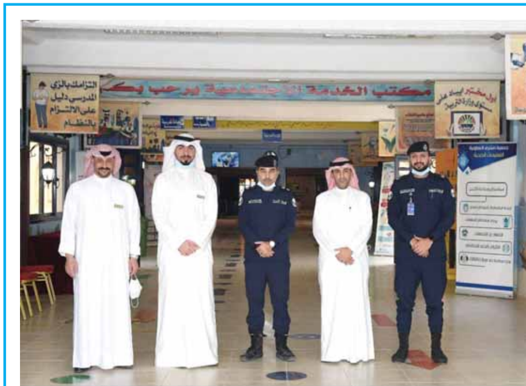
KUWAIT: Interior Ministry personnel recently visited the Saleh Al-Shehab High School for Boys as part of its campaign to spread health awareness among students following the return of in campus learning.