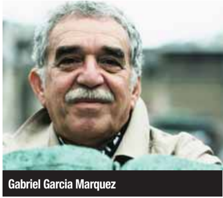
Gabriel Garcia Marquez