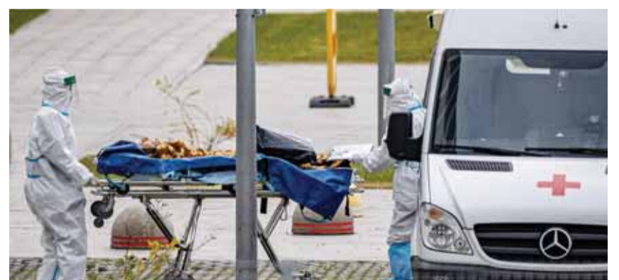
MOSCOW: Medical staff carry a person on a stretcher at the COVID-19 section of Kommunarka Hospital on Friday.