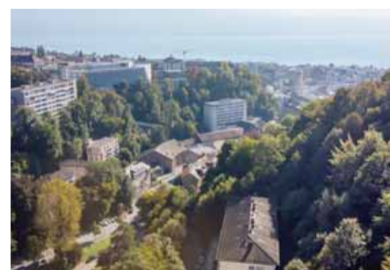
LAUSANNE: An aerial picture shows the place of a now dismantled domestic waste incineration plant blamed for dioxin pollution in Lausanne.

Gbagbo will oversee the new party's congress on Saturday and Sunday as he seeks to "reunite the left" and use the occasion as a springboard to the 2025 presidential election. The 76-year-old, whose 2000-2011 rule was marked by turbulence and division in the world's biggest cocoa producer, has