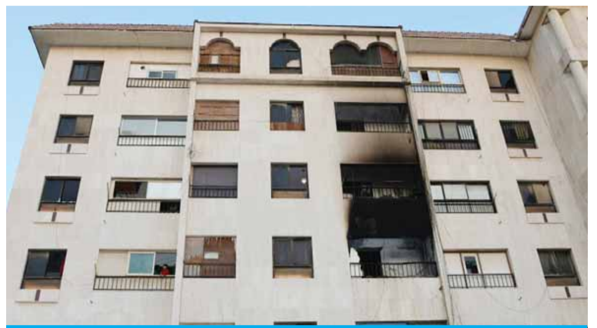
Damage left by a fire reported in a Riggae building.

In a separate case, police arrested two persons in possession of captagon pills with the intention to sell. The two were caught in an ambush while a third suspect managed to escape. A total of 375 drug pills were found with the suspects, in addition to