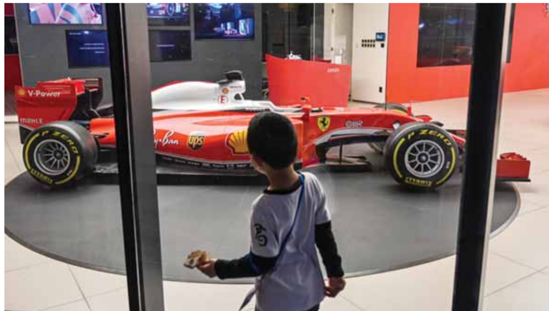
SHANGHAI: A boy looks at a Ferrari Formula 1 car displayed at a Ferrari store in Shanghai on October 14, 2021.

The 2022 season will start in Bahrain on March 20 and finish back in the Gulf at Abu Dhabi on November 20. Next year's schedule also continues a steady growth in the number of events as international sport emerges from the pandemic. In 2020,