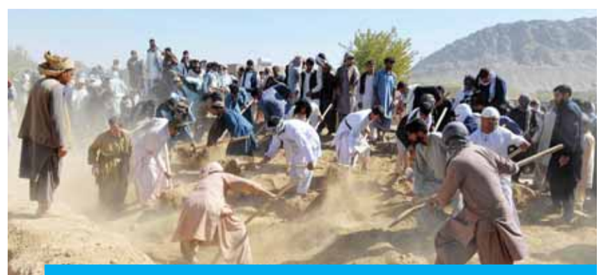
KANDAHAR: Victims of a suicide bomb attack at a Shiite mosque are buried at a graveyard yesterday.