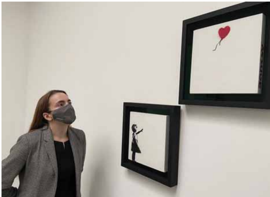
In this file photo a gallery employee poses with an artwork entitled 'Girl and Balloon' (Diptych) by Banksy, during a photocall at Christie's auction house in central London.