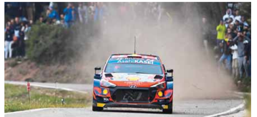
SALOU: Hyundai Shell Mobis World Rally's driver Thierry Neuville of Belgium steers his Hyundai i20 Coupe Wrc assisted by Martijn Wydaeghe of Belgium during the second day of the Catalonia 2021 FIA World Rally Championship in La Juncosa del Montmel, near Salou, on Saturday.

"Looking like Neuville is running away, which means the championship fight will continue. Let's hope we can get two cars on the podium. That's the most important thing for the manufacturers' championship," said the Finn.