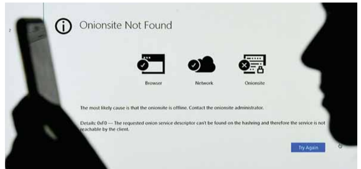
ARLINGTON: A screen displays the Darkside Onionsite address with a notice saying it could not be found. Servers for Darkside were taken down by unknown actors after the cyber extortionist forced the shutdown of a large US oil pipeline in a ransomware scam.

The United States gathered the countries-with the notable exception of Russia-to unify and boost