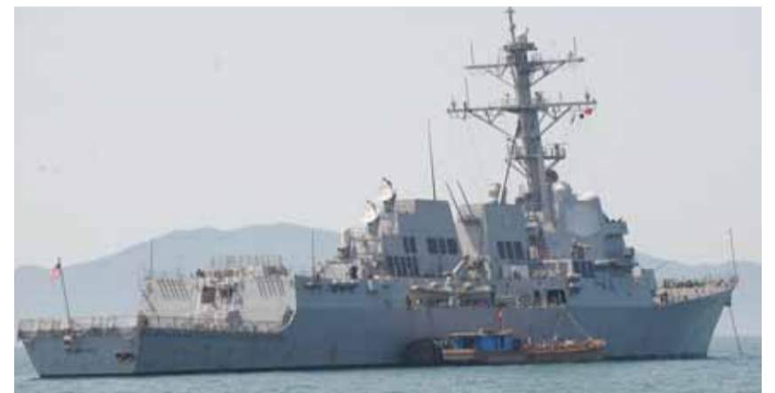
DANANG: The guided missile destroyer USS Chafee is seen anchored as a group of Vietnamese navy's officers attend a disaster control training with US sailors at Tien Sa port in the central city of Danang. A Russian and US warship came close to an incident on October 15, 2021 in the Sea of Japan.