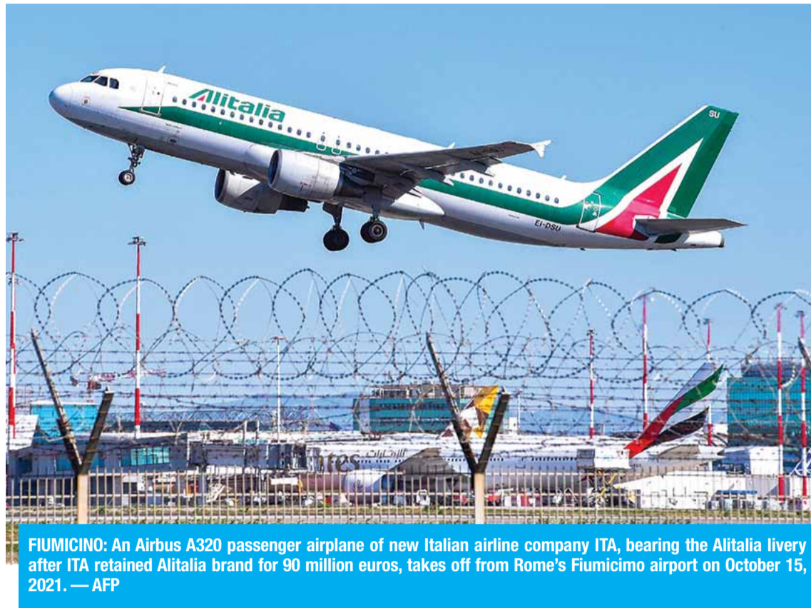
FIUMICINO: An Airbus A320 passenger airplane of new Italian airline company ITA, bearing the Alitalia livery after ITA retained Alitalia brand for 90 million euros, takes off from Rome's Fiumicino airport on October 15, 2021.