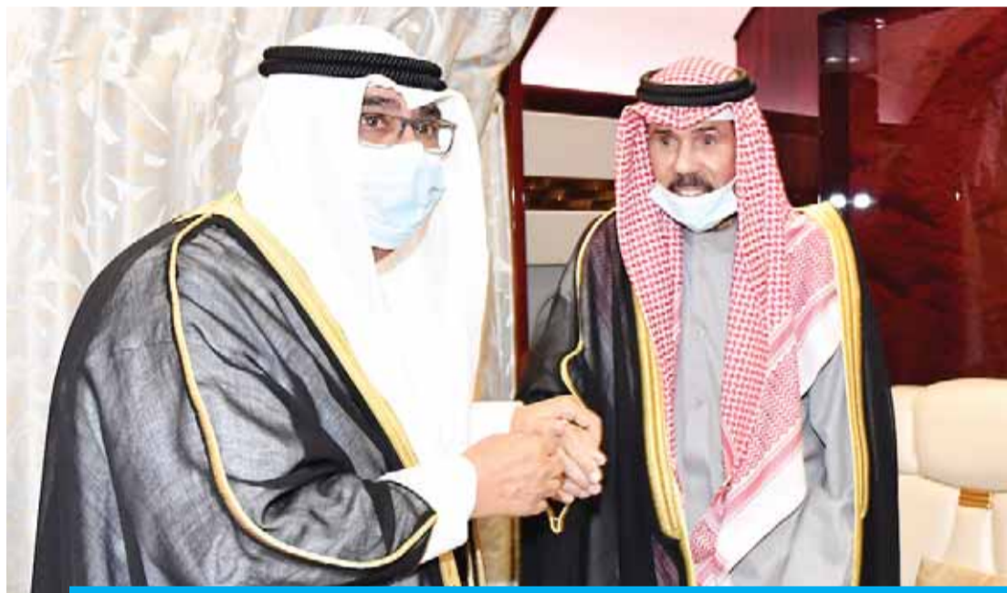
KUWAIT: HH the Amir Sheikh Nawaf Al-Ahmad Al-Jaber Al-Sabah is received by HH the Crown Prince Sheikh Mishal Al-Ahmad Al-Jaber Al-Sabah after he returned home yesterday after a private visit abroad. National Assembly Speaker Marzouq Al-Ghanem, HH the Prime Minister Sheikh Sabah Al-Khaled Al-Hamad Al-Sabah and other senior officials were also present to welcome HH the Amir.

LEIGH-ON-SEA, United Kingdom: The fatal stabbing of British lawmaker David Amess was a terrorist incident with possible links to Islamist extremism, police said yesterday, as the government ordered a review of safety measures to protect MPs. Veteran Conservative MP David Amess, 69, was talking with voters at a church in the small town of Leigh-on-Sea east of London when he was stabbed to death on Friday.