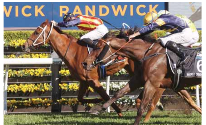
SYDNEY: Nature Strip (left), ridden by jockey James McDonald, takes a lead to win the Everest 2021 horse race at the Royal Randwick race course in Sydney yesterday.

When the IPL started, it clashed with international fixtures and then England captain Kevin Pietersen found himself involved in rows with then team management over his desire to play in the new event. As the gifted batsman recalled in a