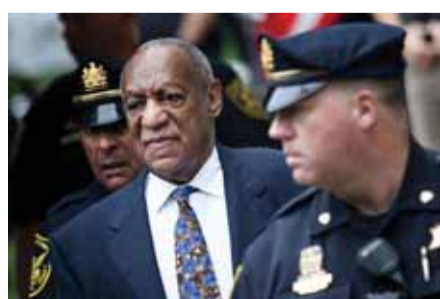
In this file photo US actor Bill Cosby arrives at court in Norristown, Pennsylvania to face sentencing for sexual assault.