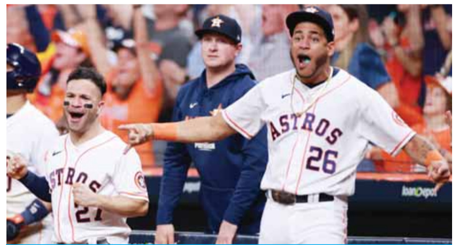
HOUSTON: Jose Altuve #27 of the Houston Astros reacts to Carlos Correa #1's home run during the seventh inning against the Boston Red Sox during Game One of the American League Championship Series at Minute Maid Park on Friday in Houston, Texas.

Hernandez did everything he could for the Red Sox. Along with his two homers — the first a towering 448-foot blast off Valdez — he had a single and a double. With the bases loaded and two outs in the bottom of the second inning, he came up with a spectacular diving catch to end the frame.