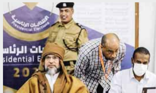
SEBHA, Libya: Seif al-Islam Gaddafi, son of slain Libyan dictator Muammar Gaddafi, registers to run in the country's presidential polls in this southern city yesterday.

TRIPOLI: Wanted Libyan war crimes suspect Seif al-Islam Gaddafi, son of slain dictator Muammar Gaddafi and once seen as his heir apparent, registered to run yesterday for next month's presidential election. Libya's first ever direct presidential poll, with a first round on Dec 24, would mark the climax of a process launched last year by the United Nations to try to draw a line under years of violence since the revolt that toppled Gaddafi in 2011.