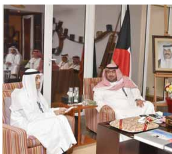
Kuwaiti Minister of Interior Sheikh Thamer Ali Al-Sabah meets GCC Secretary General Dr Nayef Al-Hajraf.