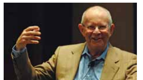
In this file photo internationally acclaimed Central African born author, Wilbur Smith, shares his experience during the second day of the International Festival of Literature in Dubai.