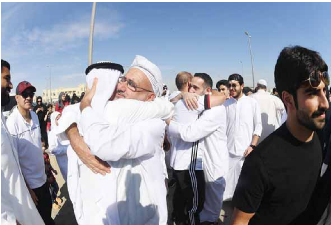
KUWAIT: Inmates imprisoned in the Abdaly cell case are welcomed after they were freed yesterday under the Amiri pardon.

Opposition exiles to start returning today • 6 'Abdaly cell' abettors freed