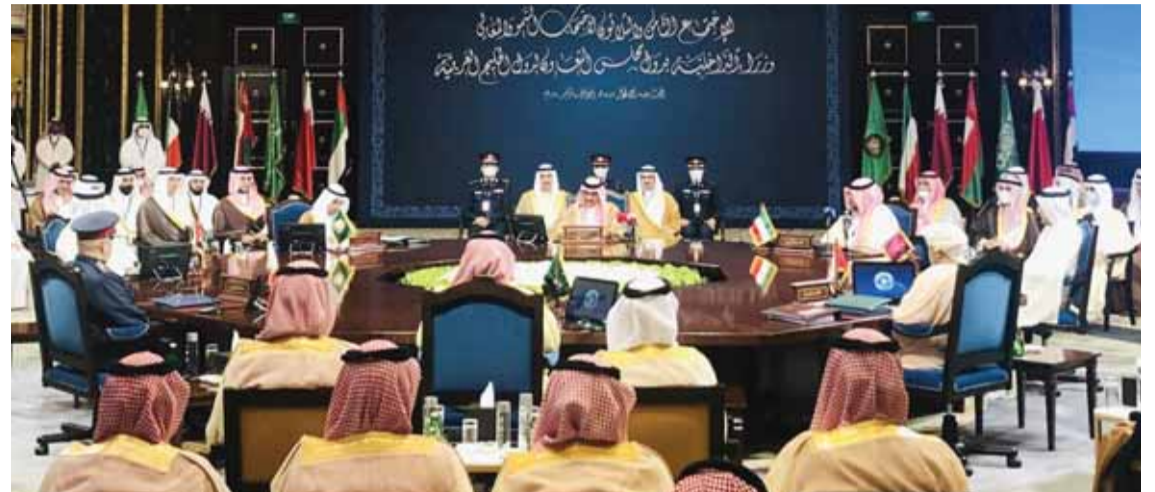
The 38th meeting of the GCC ministers of interior in progress.

MANAMA: The visiting Kuwaiti Minister of Interior Sheikh Thamer Ali Al-Sabah yesterday affirmed the State of Kuwait's categorical rejection of the recurring terrorist attacks on the sisterly Saudi Arabia, targeting civilians and key installations of the kingdom. Addressing the 38th meeting of the GCC ministers of interior, Sheikh Thamer stressed on siding with the Kingdom of Saudi Arabia regarding all measures it may take to protect its citizens and territories on grounds that "security of the Gulf is inseparable." He affirmed that these recurring attacks on the Saudi vital and oil sites, designed to target the world energy supplies, war-