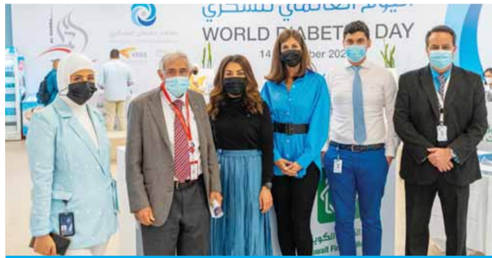
KUWAIT: Officials pose for a group photo during a diabetes awareness event hosted at Al-Hamra Shopping Center.

KUWAIT: Joining the global fight against diabetes, Al-Hamra Real Estate Company recently hosted Dasman Diabetes Institute (DDI) at Al-Hamra Shopping Center to raise awareness on the growing health concerns posed by diabetes. Marking World Diabetes Day annually, the event themed 'Access to Diabetes Care' this year, was held in partnership with Kuwait Foundation for the Advancement of Sciences, Kuwait Finance House, and Kuwaiti Danish Dairy Company (KDD).