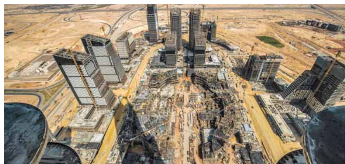
NEW ADMINISTRATIVE CAPITAL: This file photo shows a view of construction work ongoing at the 'business and finance district' of Egypt's 'New Administrative Capital' megaproject, some 45 kilometers east of Cairo. — AFP

Earlier, Washington's embassy in Khartoum said it regretted the loss of life and injuries to "dozens of Sudanese citizens demonstrating...for freedom and democracy." Gunshots were heard and tear gas fired as security forces tried to break up Saturday's protests, witnesses and AFP correspondents said. But police denied using "live rounds" and said 39 of their personnel were "severely wounded" in confrontations with the protesters, whom they accused of attacking police stations. — AFP