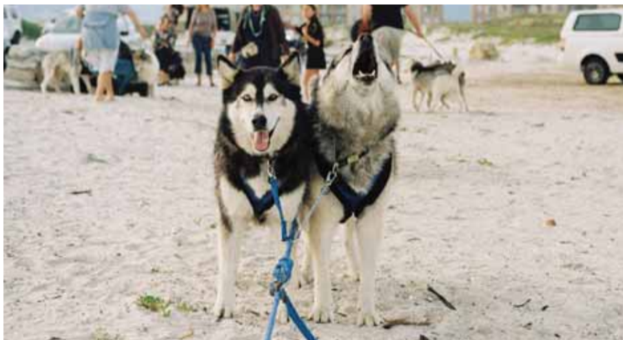
One of the first pairs of dogs tied to the rope, is excited about the start of the race.