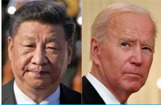
WASHINGTON: This combination of file pictures shows Chinese President Xi Jinping (left) and US President Joe Biden. US President Joe Biden will hold a hotly anticipated virtual summit with his Chinese counterpart Xi Jinping today, the White House announced, as tensions mount over Taiwan, human rights and trade.

WASHINGTON: The top diplomats from China and the United States have exchanged stern warnings over the flashpoint issue of Taiwan, ahead of today's highly awaited summit between their leaders. The virtual meeting of presidents Joe Biden and Xi Jinping comes against a backdrop of rising tensions - in part over Taiwan, a self-ruling democracy claimed by Beijing, but also over trade, human rights and other issues. In a phone call Friday with Chinese Foreign Minister Wang Yi to discuss preparations for the summit, US Secretary of State Antony Blinken raised concerns over Beijing's "military, diplomatic, and economic pressure" on Taiwan.