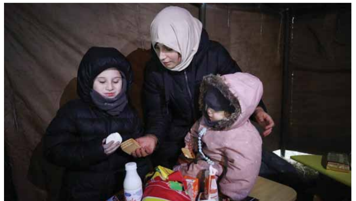
GRODNO: A family has a meal at a camp set up by migrants near the Belarusian-Polish border in the Grodno region.

a total lie and nonsense! Poland will continue to protect its border with Belarus. "Those who spread such rumors seek to encourage the migrants to storm the border, which may lead to dangerous developments," the text message reads. EU foreign ministers are also due to meet on Monday to widen the sanctions already imposed on Belarus for its crackdown on opponents of Lukashenko, who has ruled the country for nearly 30 years.