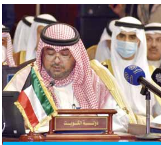
Kuwait's Minister of Interior Sheikh Thamer Ali Al-Sabah speaks during the meeting.

MANAMA: The visiting Kuwaiti Minister of Interior Sheikh Thamer Ali Al-Sabah yesterday affirmed the State of Kuwait's categorical rejection of the recurring terrorist attacks on the sisterly Saudi Arabia, targeting civilians and key installations of the kingdom. Addressing the 38th meeting of the GCC ministers of interior, Sheikh Thamer stressed on siding with the Kingdom of Saudi Arabia regarding all measures it may take to protect its citizens and territories on grounds that "security of the Gulf is inseparable." He affirmed that these recurring attacks on the Saudi vital and oil sites, designed to target the world energy supplies, war-