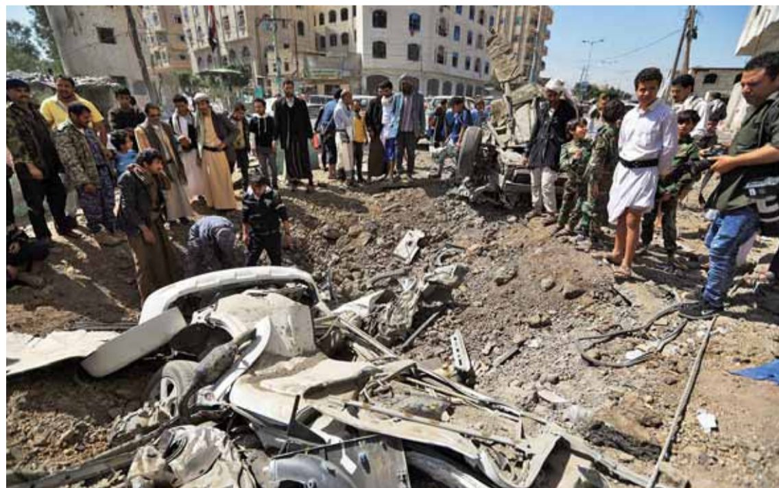
SANAA: Yemenis inspect the site of reported Saudi-led airstrikes targeting the Houthi-controlled capital Sanaa.

In a statement, the Nangarhar governor's office said officials had arrested two "perpetrators" in connection with the mosque blast, but provided no other details. "Further investigation into the incident is ongoing and more actions will be taken," it said. While Kabul has largely been free of Islamic State activity since the Taliban takeover, IS fighters recently raided the city's National Military Hospital, killing at least 19 people and injuring more than 50 others.