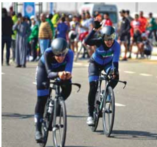
Members of Kuwait's national women's cycling team compete during the Arab Championship.