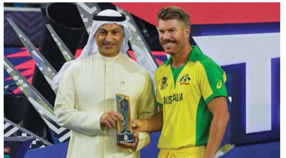
Australia's David Warner receives the Player of the Tournament trophy yesterday.

Zampa sent Gupthill trudging back to the dugout after the opener's 35-ball 28