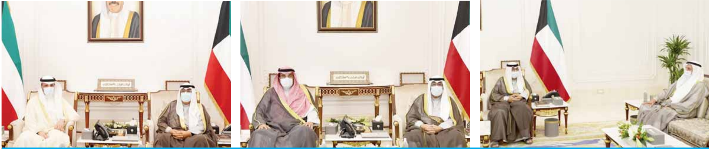
KUWAIT: His Highness the Crown Prince Sheikh Mishal Al-Ahmad Al-Jaber Al-Sabah received yesterday at Bayan Palace National Assembly Speaker Marzouq Ali Al-Ghanem, His Highness the Prime Minister Sheikh Sabah Al-Khaled Al-Hamad Al-Sabah and Deputy Prime Minister, Minister of Justice and Minister of State for Nazaha (integrity) Enhancement Abdullah Al-Roumi.