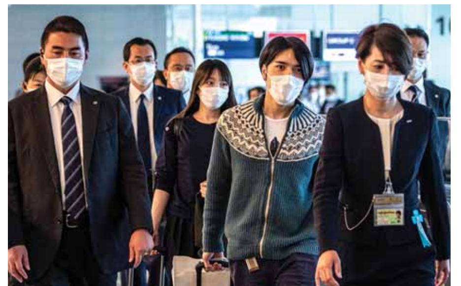
Japan's former princess Mako Komuro (center), the elder daughter of Prince Akishino and Princess Kiko, and her husband Kei Komuro (second right) walk to their departure gate for their flight to New York at Tokyo's Haneda international airport yesterday.

Apple. The original plan had been for Kei to travel to the United States ahead of Mako, with the former princess joining him after she got her first passport, reports said. But Kei stayed in Japan longer than expected to attend the funeral of Mako's grandfather. Japan's emperor holds no political power, but is an important symbolic figurehead. With a dwindling supply