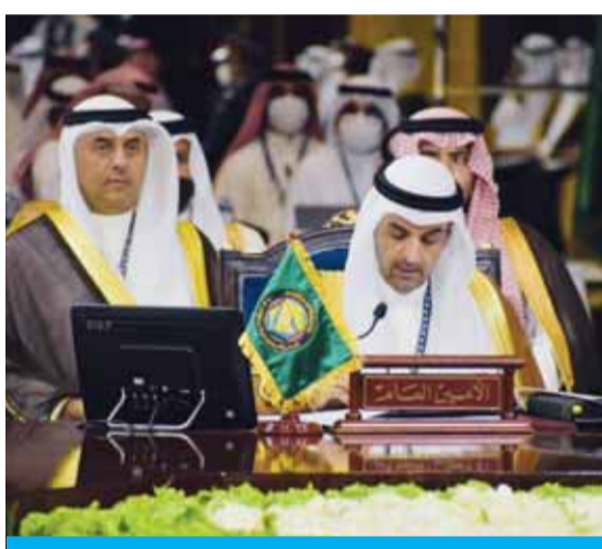
GCC Secretary General Dr Nayef Al-Hajraf addresses the gathering.

namely the terrorist attacks with missiles and drones on Saudi Arabia. Speaking at the start of the session, the minister said he and his peers would address issues such as cyber-attacks, guided media and violent extremism. He decried the recurring terrorist attacks targeting the Kingdom of Saudi Arabia, reaffirming that Manama supports any measures Riyadh might take in the face of these attacks.