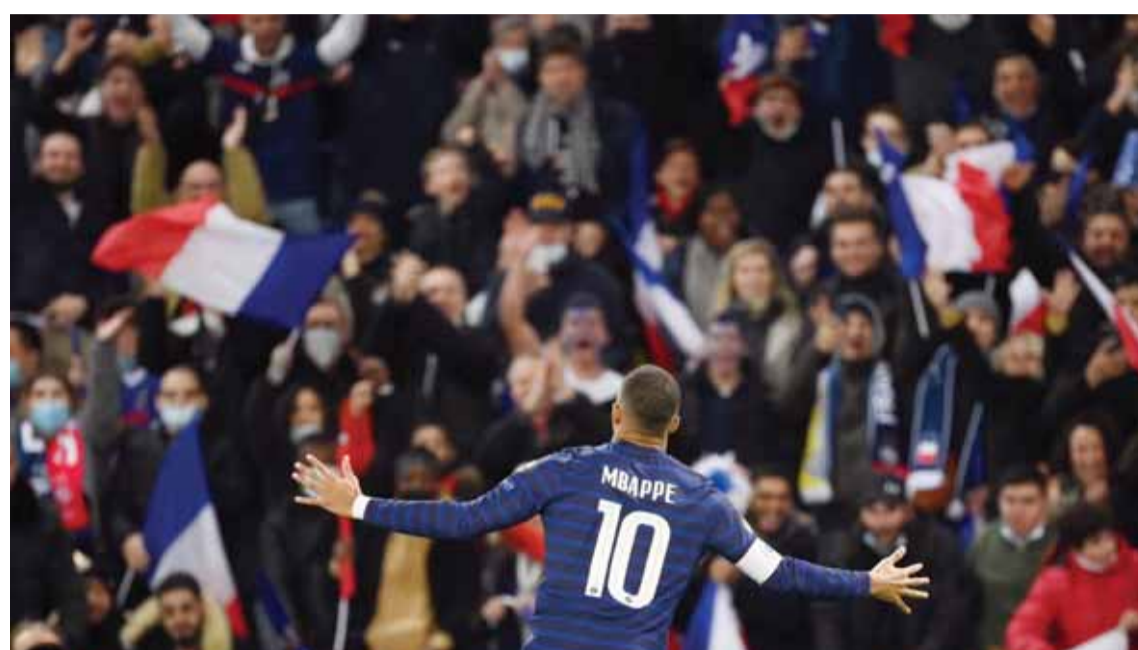
PARIS: France's forward Kylian Mbappe celebrates after scoring a goal during the FIFA World Cup 2022 qualification football match between France and Kazakhstan at the Parc des Princes stadium in Paris, on Saturday.