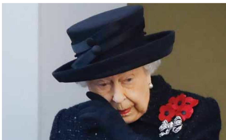
LONDON: In this file photo, Britain's Queen Elizabeth II attends a ceremony at the Cenotaph on Whitehall in central London.

Charles and his son Prince William represented the family in Glasgow, making a series of speeches. A two-day trip to Northern Ireland was also shelved as was her appearance Tuesday at the General Synod, the national assembly of the Church of England which she heads. The 95-year-old was due to view Sunday's annual service in London from a balcony, as she has done since 2017, when she handed over some duties to younger members of the family. "Mindful of her doctors' recent advice, The Queen has decided not