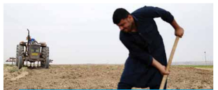
TEL KAIF, Iraq: A farmer works on agricultural land on the outskirts of this town north of Mosul on Oct 26, 2021.