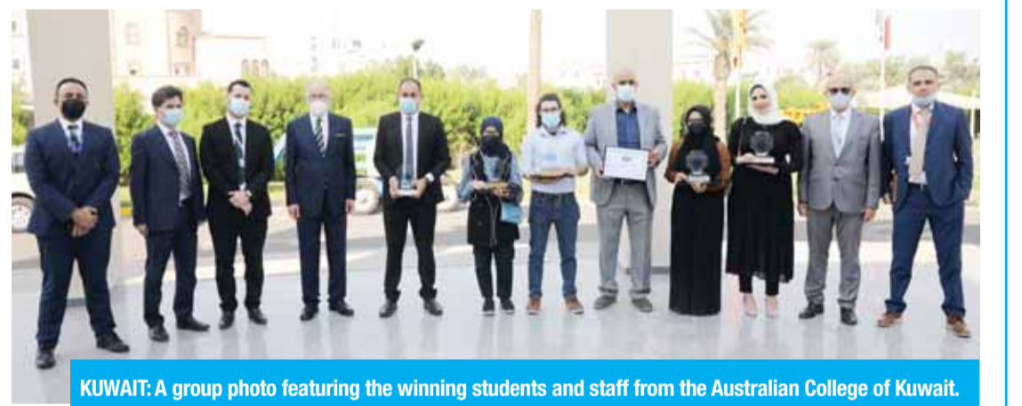
KUWAIT: A group photo featuring the winning students and staff from the Australian College of Kuwait.