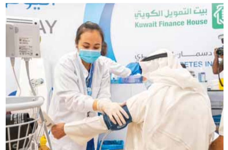
A man undergoes a medical check up during the event.