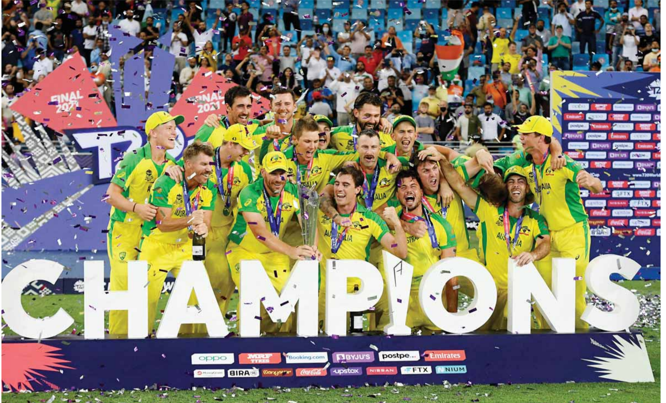
DUBAI: Australia's players pose with the trophy after winning the ICC men's Twenty20 World Cup final match against New Zealand at the Dubai International Cricket Stadium yesterday.