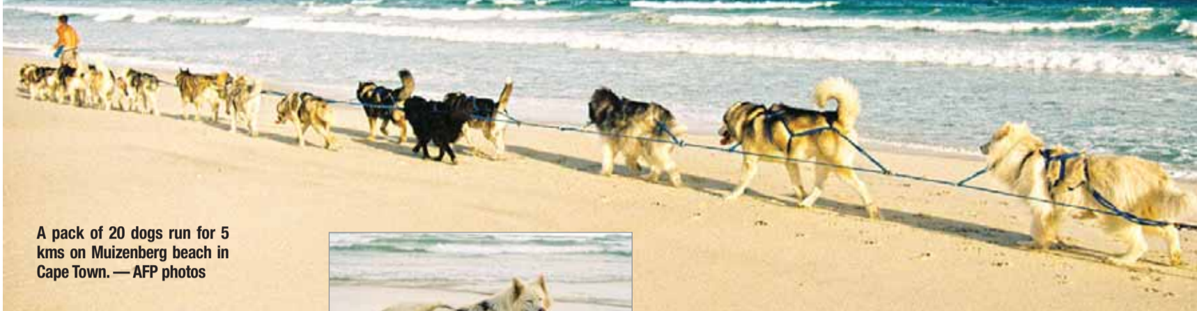
A pack of 20 dogs run for 5 kms on Muizenberg beach in Cape Town.