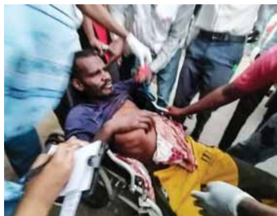
KHARTOUM: Sudanese protesters carry an injured man to safety during an anti-coup demonstration in the Khartoum Barre neighborhood, outside the capital.