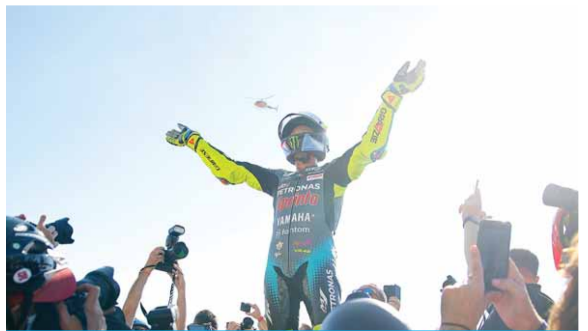
CHESTE, Spain: Petronas Yamaha SRT Italian rider Valentino Rossi waves after the MotoGP race of the Valencia Grand Prix at the Ricardo Tormo racetrack yesterday.

He added six more in the new MotoGP class in 2002, 2003, 2004, 2005, 2008 and 2009, the first two with Honda, the rest with Yamaha. He retires