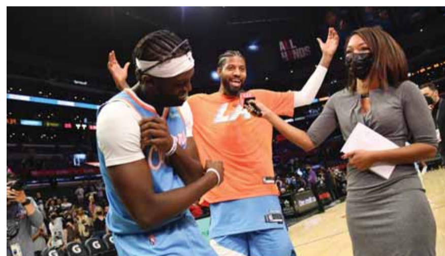
LOS ANGELES: Reggie Jackson (left) and Paul George of the LA Clippers are interviewed after the game against the Minnesota Timberwolves on Saturday at STAPLES Center in Los Angeles, California.

Bojan Bogdanovic scored 19 of his 26 points in the fourth quarter to lead the Jazz, who lost for the fourth time in their last five games. The two teams meet just twice this season. Miami also won the first meeting 118-115 on November 6 in Florida.