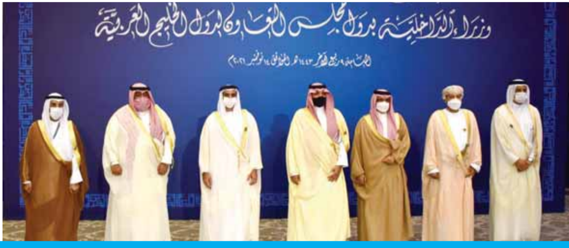
MANAMA: Interior Ministers of the Gulf Cooperation Council countries pose for a group photo during their meeting in Manama, Bahrain yesterday.

Interior Minister urges more GCC cooperation on combating cybercrime