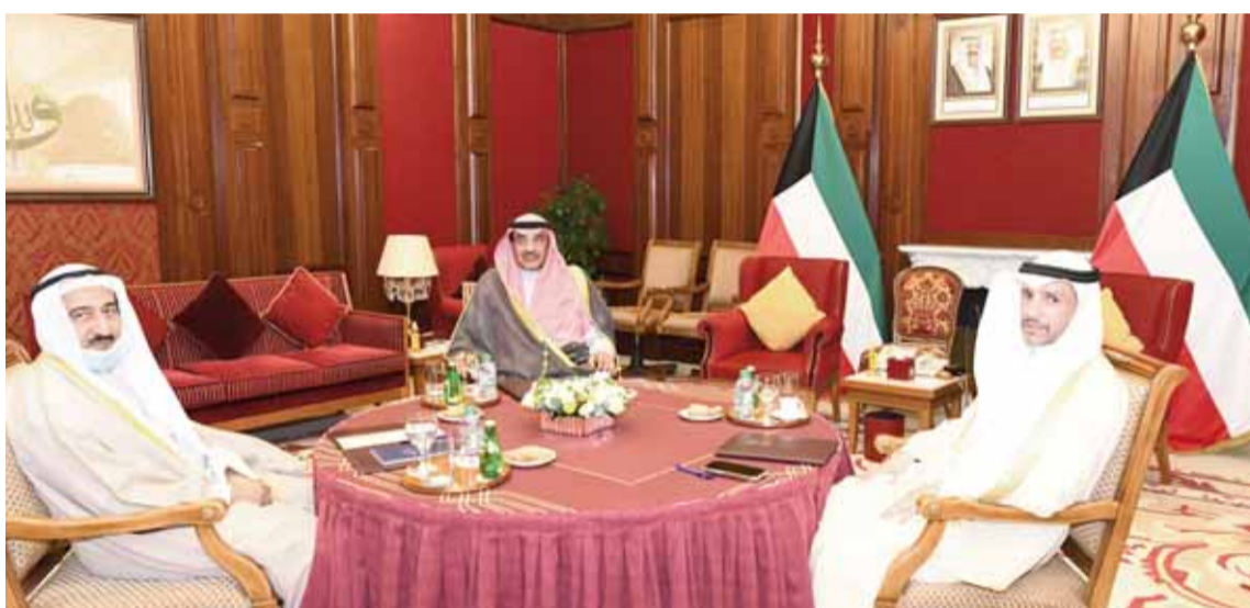
KUWAIT: National Assembly Speaker Marzouq Al-Ghanem (right), His Highness the Prime Minister Sheikh Sabah Al-Khaled Al-Hamad Al-Sabah (center) and President of the Supreme Court and Chairman of the Court of Cassation Justice Ahmad Al-Ajeel meet at Bayan Palace yesterday.

KUWAIT: Upon directives from His Highness the Amir Sheikh Nawaf Al-Ahmad Al-Jaber Al-Sabah, the heads of the three authorities met at Bayan Palace yesterday. The meeting included Speaker of the National Assembly