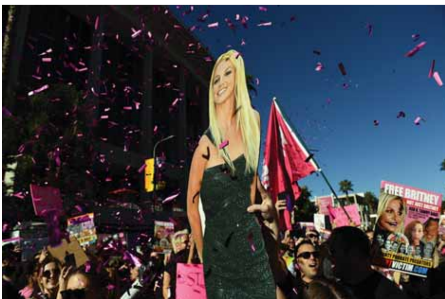
Supporters of the FreeBritney movement celebrate following a court decision ending her conservatorship outside the Stanley Mosk courthouse in Los Angeles, California.

Her primary recourse against her father would be providing evidence he mismanaged Spears's money or overcharged her in his role as her financial conservator; he stepped down as conservator of her person in 2019, with a professional taking over. Spears said recently scripts for TV and film depictions of her story have been pouring in, though she said "I'm not dead" and not interested in someone else portraying her. She has also alluded to a tell-all: "Lord have mercy on my family's souls if I ever do an interview," she wrote in October.