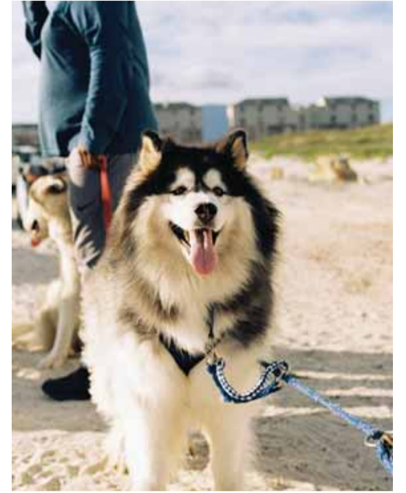
One of the 20 dogs that completes the team poses for a photograph before the start of the race at Muizenberg beach.

Muizenberg outside Cape Town can boast of many things - golden sands, colorful beach huts, great surf. But this popular spot has something its rivals can't even begin to match-teams of up to 30 huskies pulling sleds. Every Saturday, tourists and joggers are treated to scenes straight from the Arctic with dogs that have swapped snow for sand. Locals and holidaymakers alike are stunned to see the barking teams of huskies mushing along the white beach at up to 25 km/h (15 m/h) with a blue sled at the rear.