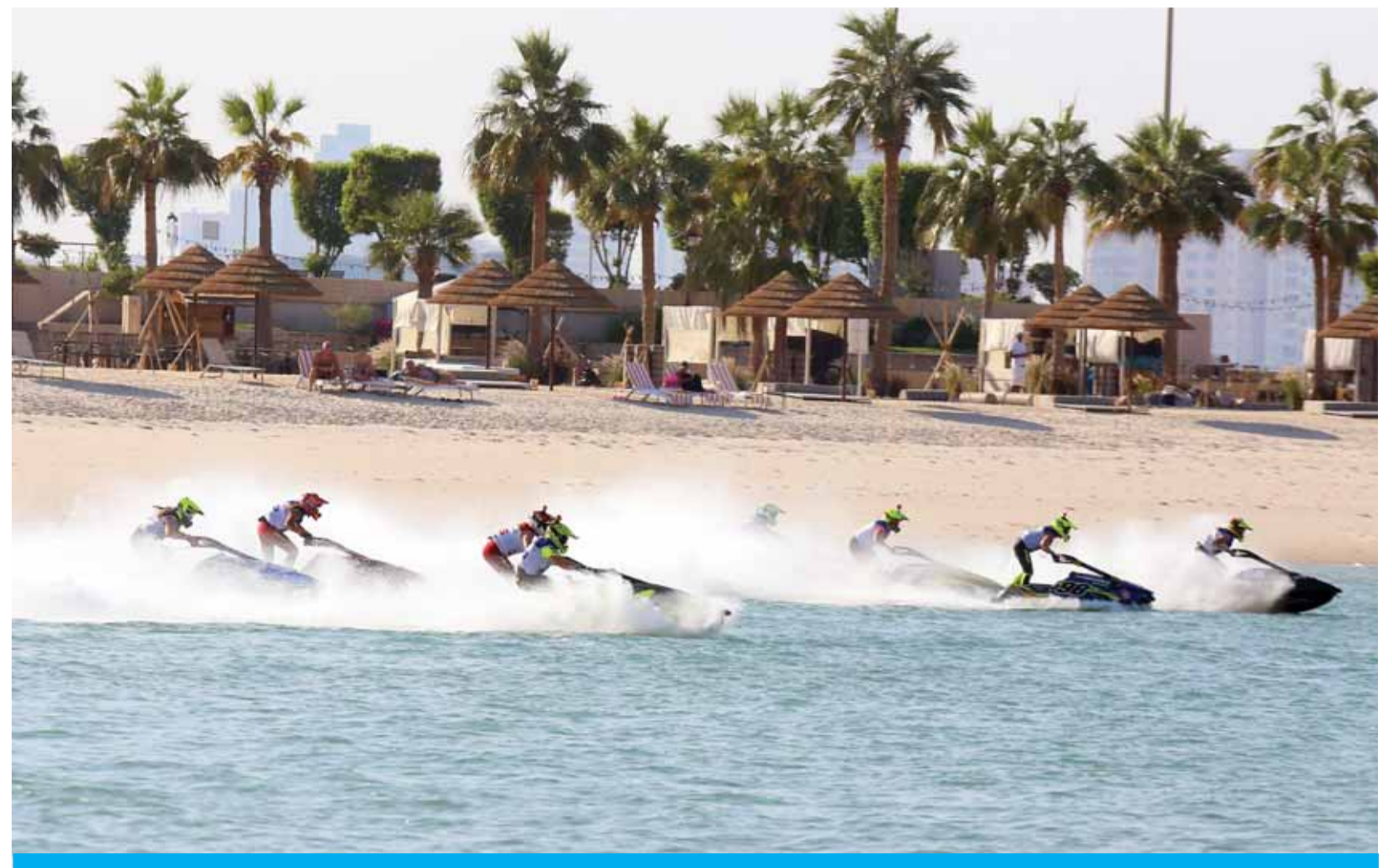
KUWAIT: Riders compete during the UIM ABP-Aquabike World Championship at the Marina beach in Salmiya on Saturday.