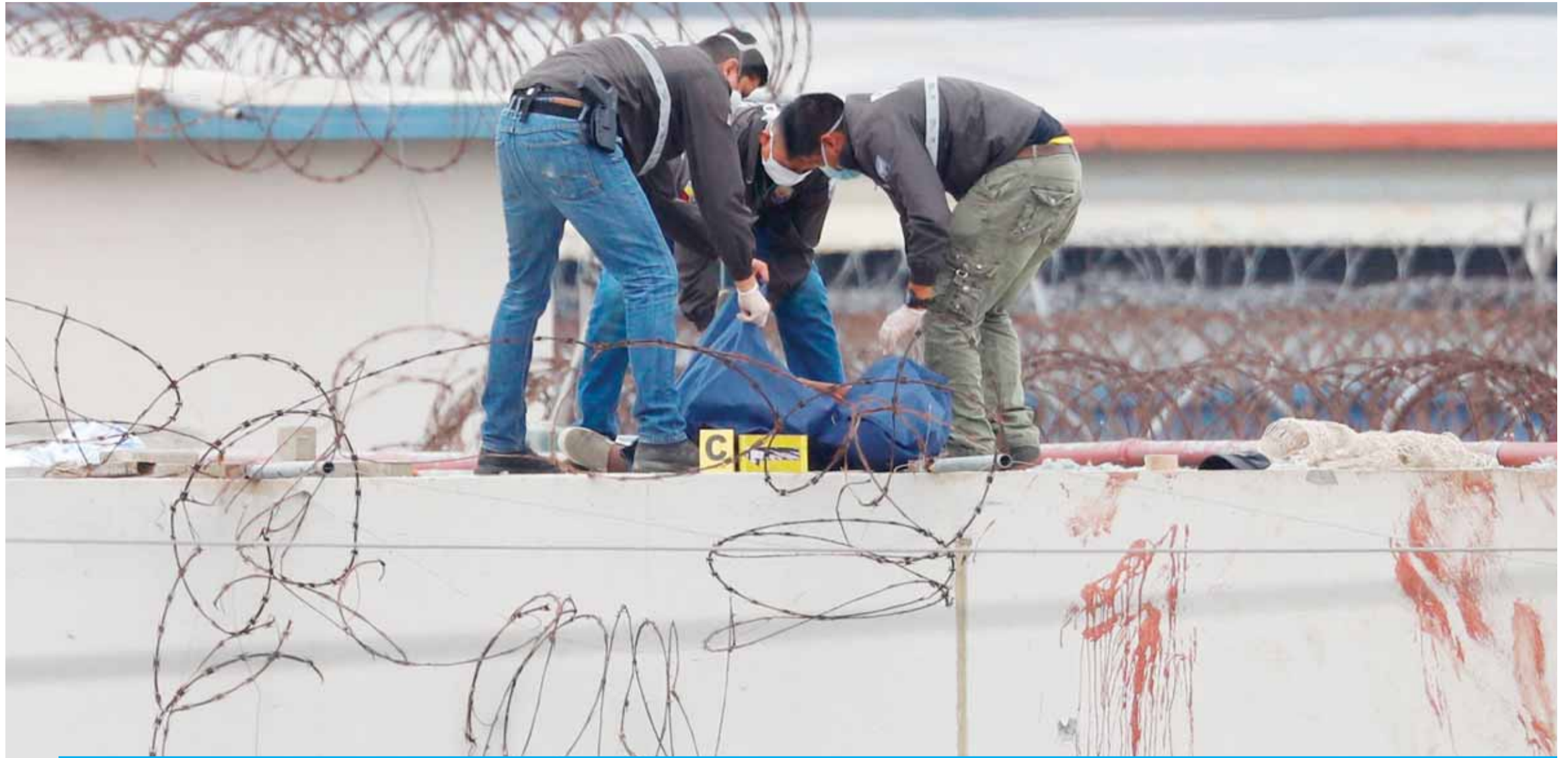
GUAYAQUIL: Members of the Ecuadorian police remove the body of an inmate on the roof of a pavilion of the Guayas 1 prison in Guayaquil, Ecuador.