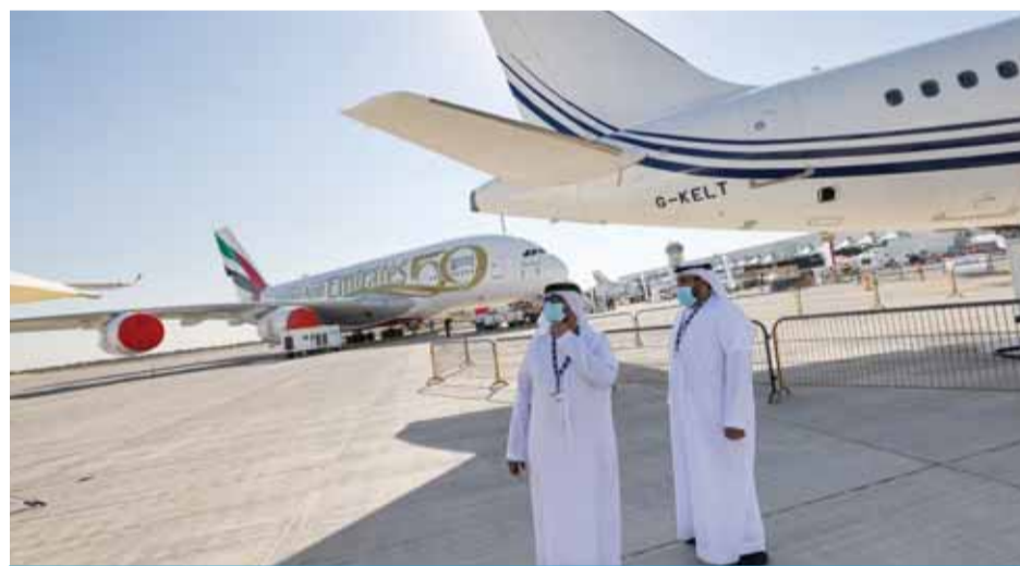
DUBAI: Two men stand next to an Acropolis Aviation Airbus A320-251N aircraft while in the background is seen another Emirates Airbus A380 aircraft on the tarmac at the 2021 Dubai Airshow in the Gulf emirate yesterday.

The pandemic will have no long-term impact on the need for new aircraft, according to a market outlook released Saturday by European plane maker Airbus,