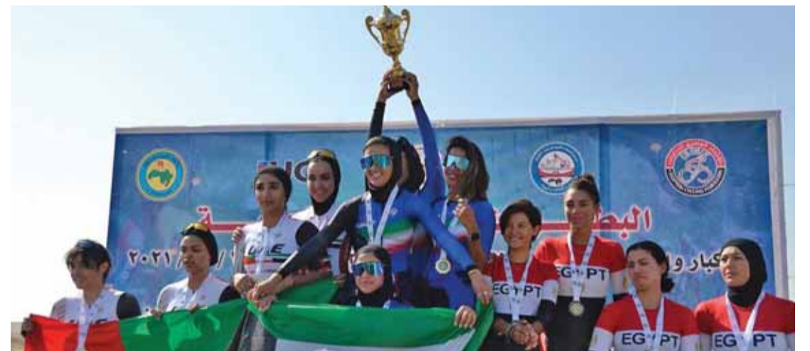
CAIRO: Kuwait's national women's cycling team (center) poses on the podium yesterday after winning the time category during the Arab Championship.

CAIRO: Kuwait's national women's cycling team took first place in the time category yesterday during the Arab Championship held in Cairo, Egypt. The team's win came after beating Egypt and the UAE whose teams finished second and third respectively. Kuwait is participating in the six-day tournament with teams in the men's, women's and juniors' competitions in various categories.