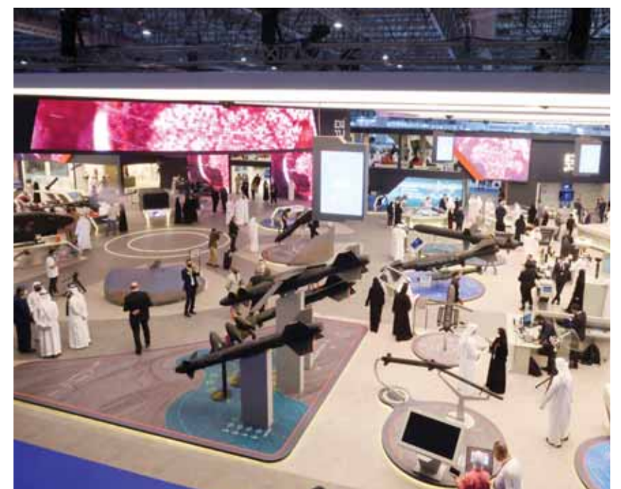
DUBAI: Military equipment is displayed at the Dubai Airshow in the Gulf emirate yesterday.

While wide-body aircraft, such as the Boeing 777, 767 and A350 have their own cargo versions, single-aisle aircraft such as the 737 do not.