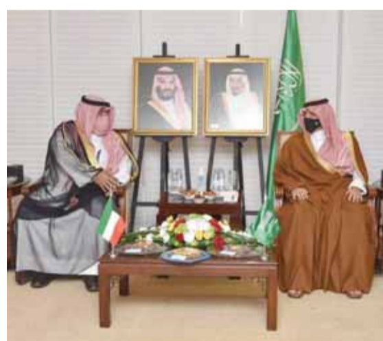
MANAMA: Kuwaiti Minister of Interior Sheikh Thamer Ali Al-Sabah meets Saudi Interior Minister Amir Abdulaziz bin Saud.

Bahraini Minister of Interior Sheikh Rashed bin Abdullah said meanwhile that the 38th GCC interior ministers' meeting aimed at examining latest regional security developments and challenges