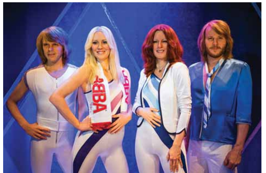
Swedish music band ABBA's wax figures are displayed at the ABBA museum in Stockholm, Sweden.

Repeatedly delayed by technical difficulties, then by the Covid-19 pandemic, they will finally be unveiled in May. The