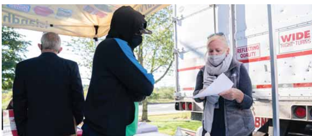
MELVILLE, US: A man speaks with a representative from Whitsons Culinary Group at the Employers Only Long Island Food, Beverage and Hospitality Job Fair in Melville, New York.