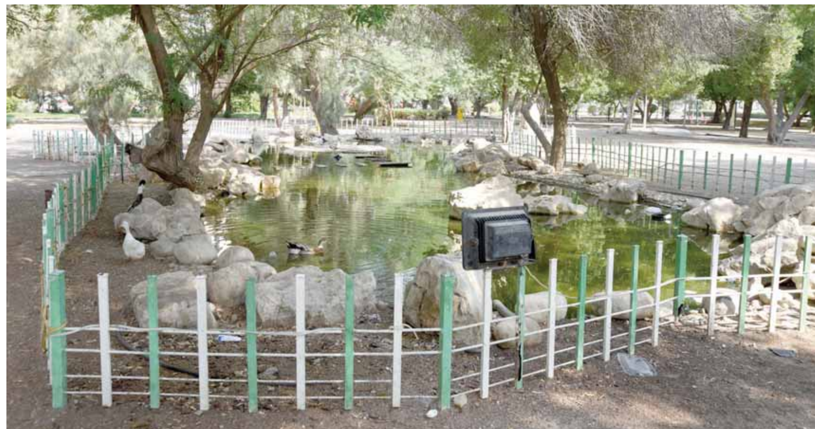
KUWAIT: Ducks swim in a small pond at a park in Shaab.