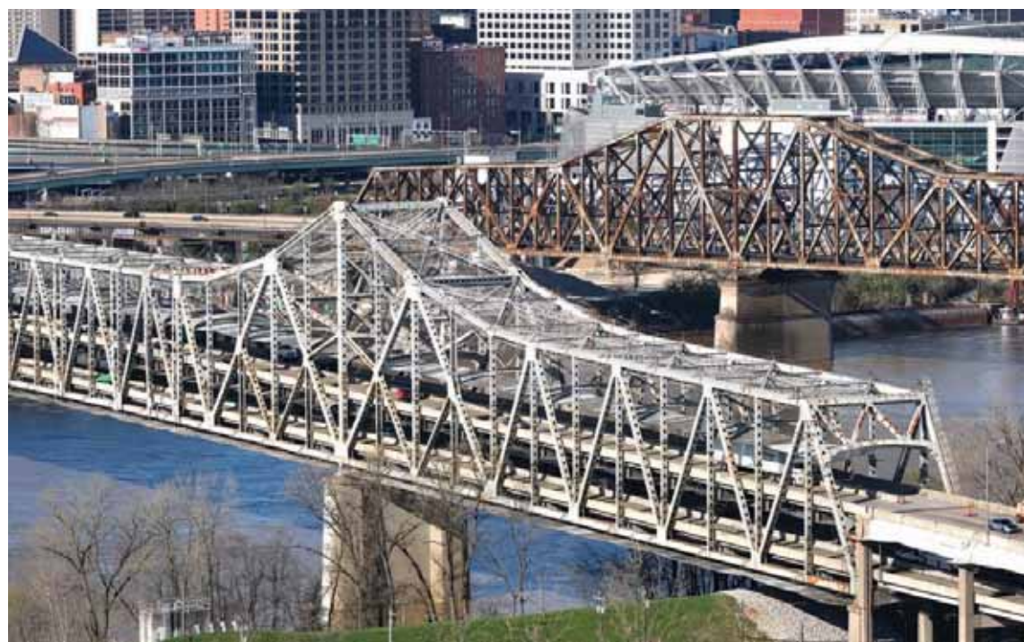
CONCINNATI: In this file photo, the Brent Spence Bridge spans the Ohio River on the Ohio-Kentucky border in Cincinnati.

Johnson launched the "Great Society," the sprawling set of socio-economic reforms which gave the federal government unprecedented influence in the daily life of Americans.—AFP