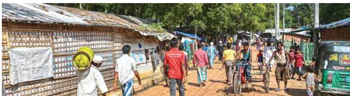
KUTUPALONG: Refugees walk near the office of top community Rohingya leader and activist Mohib Ullah, who was shot dead by gunmen in late September, at Kutupalong refugee camp in Ukhta. — AFP

"Taiwan is a democratic society with the rule of law and it's not under the jurisdiction of the other side," it said in a statement. "If (Beijing) disregards cross-strait relations to intentionally sabotage our democracy... our government will have to take necessary counter moves to protect the safety and welfare of our people, and China will have to take the responsibility for possible consequences." The statement also said China aims to "create a chilling effect with vile and unfriendly moves" to force people of a different political stance into submission and that "Taiwanese people will never compromise".—AFP