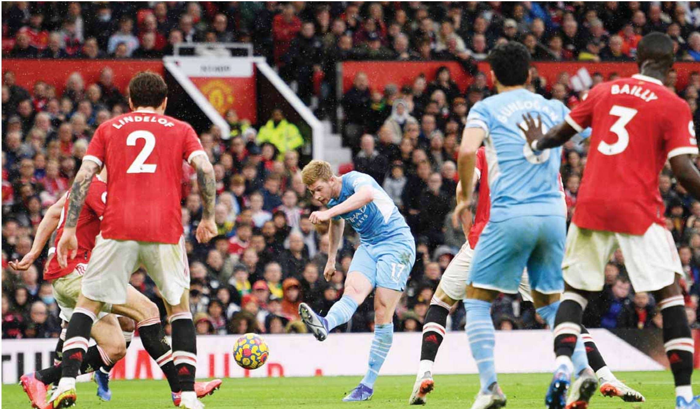
MANCHESTER: Manchester City's Belgian midfielder Kevin De Bruyne makes an attempt during the English Premier League football match between Manchester United and Manchester City at Old Trafford yesterday.