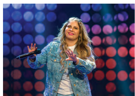
This handout file picture shows the late Brazilian singer Marilia Mendonca during a TV show called Tamanho Família, in Rio de Janeiro, Brazil.

Marilia Mendonca, one of the hottest young stars of Brazil's answer to country music, died in a plane crash on Friday, officials said. The 26-year-old mega-popular "sertanejo" singer was killed when the small plane she was traveling in crashed in Minas Gerais state, firefighters said. The crash also killed the Latin Grammy-winner's producer and one of her uncles — who worked with the singer — as well as the