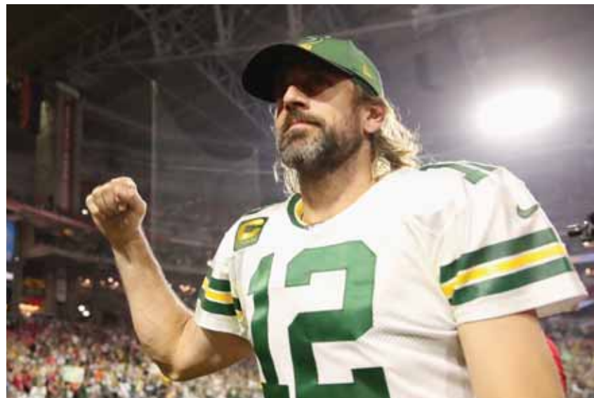
GLENDAL: In this file photo taken on October 28, 2021, Quarterback Aaron Rodgers #12 of the Green Bay Packers walks off the field following the NFL game at State Farm Stadium in Glendale, Arizona.

the woke mob right now, so before the final nail gets put in my cancel culture casket, I think I'd like to set the record straight on so many of the blatant lies that are out there about myself right now," Rodgers told the show.