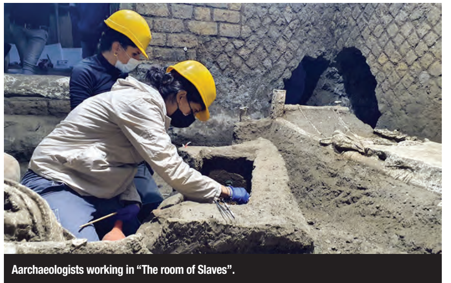
Archaeologists working in "The room of Slaves".