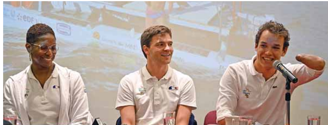
LA PAZ: French Paralympic medalist Theo Curin (right) speaks next to former French Olympic swimmer Malia Metella (left) and French eco-adventurer Matthieu Witvoet, during a press conference where he announced his intention to cross Lake Titicaca in ten days, linking the Bolivian population of Copacabana and the Peruvian region of Puno, on Friday in La Paz. — AFP

Besides the long distance they will have to cover and the high altitude which will make the task more difficult, the swimmers will come up against the cold: the water temperature is just 10 degrees Celsius. They will take turns to swim an expected 12 kilometers a day while the other two will keep warm and fed in a boat traveling alongside the swimmer. — AFP