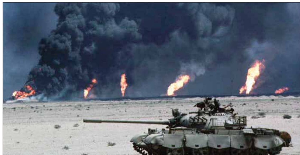
KUWAIT: An archive photo from the Iraqi invasion period showing heavy plumes of smoke billowing from burning oil wells in Kuwait.

Eqab recalled that the State of Kuwait had seen the worst environmental disaster in modern history during the Iraqi invasion as 1,037 oil wells were destroyed, causing serious air pollution nationwide. However, she maintained, Kuwait has been leaving no stone unturned to overcome the