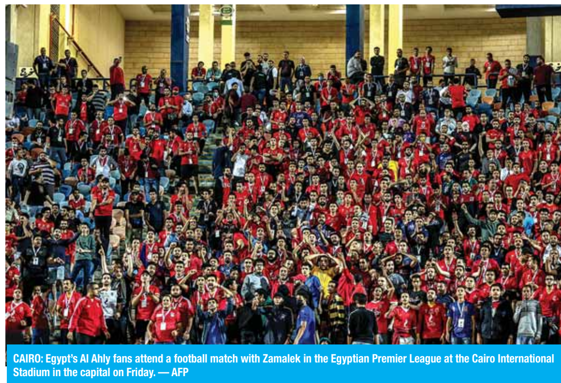
CAIRO: Egypt's Al Ahly fans attend a football match with Zamalek in the Egyptian Premier League at the Cairo International Stadium in the capital on Friday.

who joined from Manchester City in pre-season, will be sidelined for at least three months after suffering a chest injury. Koeman constantly asked for realistic expectations but his downbeat assessment bordered on defeatist at times. Barca may not be able to afford a star signing like Kylian Mbappe to fill the void but for now, the players just appear in need of some confidence.