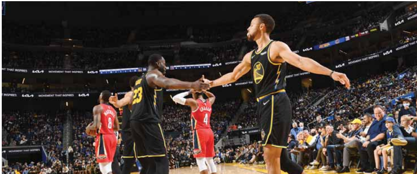
SAN FRANCISCO: Stephen Curry #30 and Draymond Green #23 of the Golden State Warriors shake hands during the game against the New Orleans Pelicans on Friday at Chase Center in San Francisco, California.

last two years. The "Worlds 2021" competition in League of Legends is currently taking place in Iceland but behind doors closed, just like "The International", the flagship competition for Dota 2, three weeks ago. — AFP