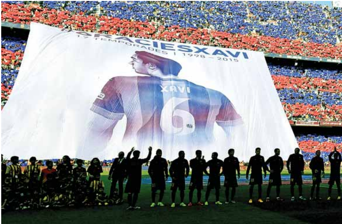
BARCELONA: In this file photo taken on May 23, 2015 Barcelona's supporters hold a huge flag bearing the portrait of Barcelona's midfielder Xavi Hernandez paying tribute to Hernandez before the Spanish league football match between FC Barcelona and RC Deportivo La Coruna at the Camp Nou stadium in Barcelona.

One of Koeman's biggest achievements was promoting a talented group of youngsters and the challenge now will be to maximize their potential. Ansu Fati and Pedri are the great hopes for the future but the likes of Ronald Araujo, Sergino Dest, Gavi, Nico Gonzalez and Alex Balde have also shown promise and need nurturing. If they can thrive alongside more experienced players like Gerard Pique, Sergio Busquets and Jordi Alba, whose futures must also be managed, Barca can have an exciting team for the future.