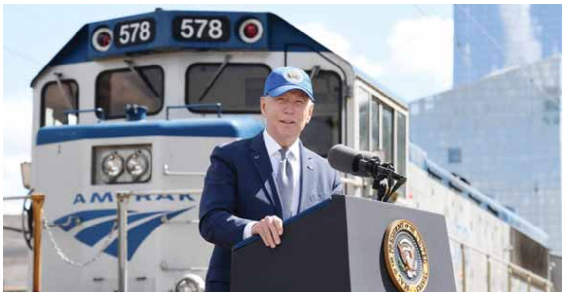
PHILADELPHIA: US President Joe Biden delivers remarks at an event marking Amtrak's 50th Anniversary in Philadelphia. Democrats rescued Biden's faltering domestic agenda Friday, passing a giant infrastructure package that is one of the pillars of his $3 trillion economic vision.

America's famous yellow school buses would go zero-emission and a national network of charging stations developed to stimulate the electric vehicle market. Finally, it includes measures to safeguard against cyberattacks, which have recently targeted the distribution of fuel and other companies.