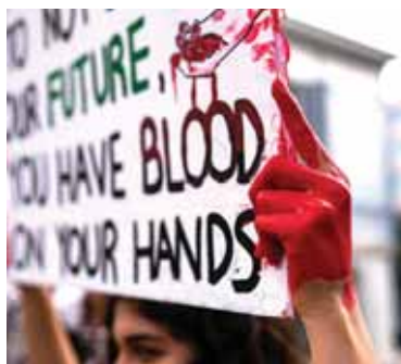
Thunberg labels COP26 a 'failure'