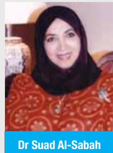
Dr Suad Al-Sabah

"Dialogue of Roses and Guns" speaks about an important period of the poetic experience of Dr Suad that spans over 50 years. It also accounts for the reflections of the childhood years she spent in Az-Zubayr on her poems, her movements in life and her poetic growth following many experiences in the fields of writing and organizing many events around the world, besides being involved in many intellectual battles.