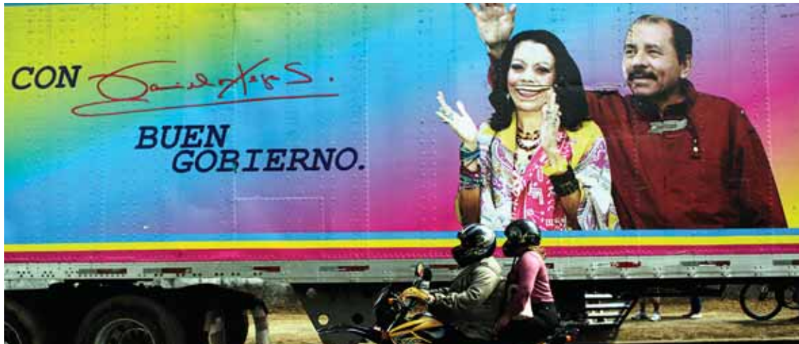
MASAYA: A motorbiker drives past a banner of Nicaragua's President -and presidential candidate- Daniel Ortega and his wife and running mate Rosario Murillo, placed on a mobile clinic, in Masaya.

A firebrand Marxist in his youth, Ortega ruled Nicaragua from 1979 to 1990, after the guerrilla ousting of US-backed dictator Anastasio Somoza Debayle. Returning to power in 2007, he has won re-election three times, becoming increasingly authoritarian and