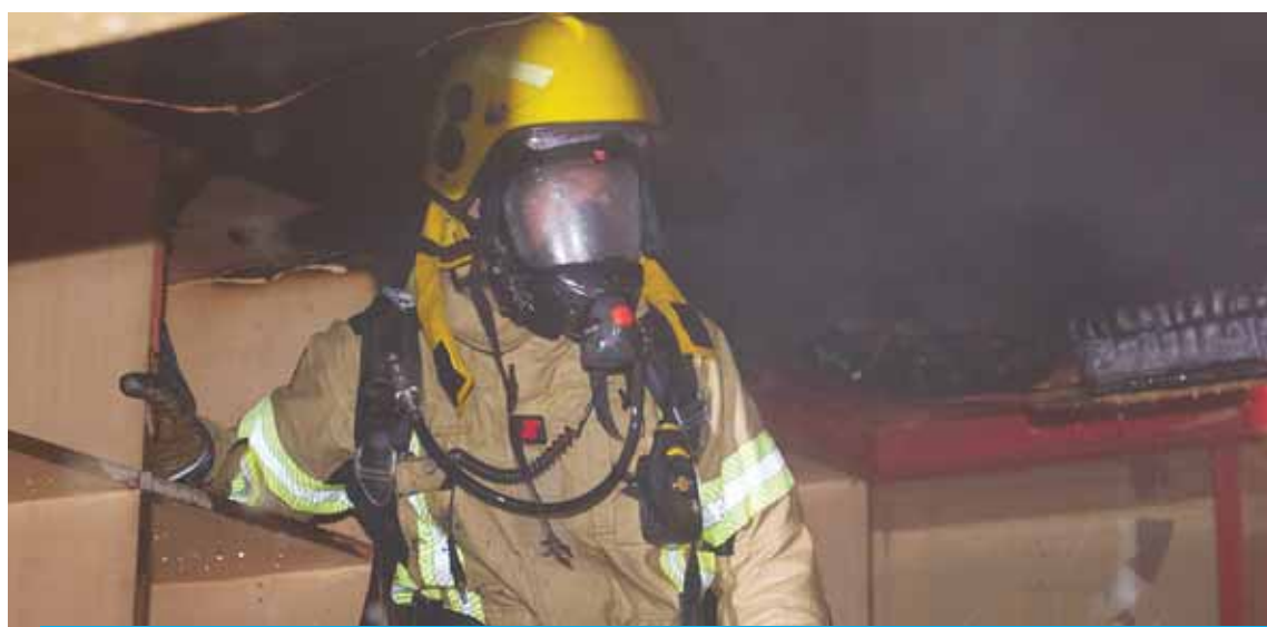
shows a fireman at the site of a blaze in Mubarakia Market.

KUWAIT: Environment police spotted a vehicle inside Sabah Al-Ahmad Natural Reserve and arrested the driver with an falcon in his possession. Police say that the suspect had caught the falcon, which is not permitted to be hunted, inside the reserve. The falcon was confiscated and will be returned to its natural habitat, according to police. Further legal action will be taken, police said.