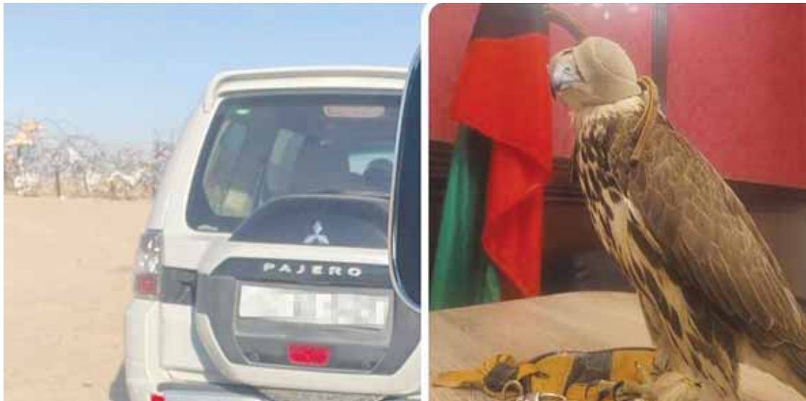
KUWAIT: This handout photo released by the interior ministry shows a falcon confiscated from a person that police say had illegally hunted it in Sabah Al-Ahmad Natural Reserve.