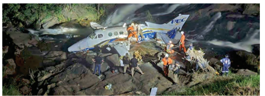
This handout picture released by Minas Gerais Fire Department shows firefighters working on the wreckage of the crashed plane where the Brazilian singer Marilia Mendonca died in Caratinga, Brazil.

place in a rural area near the city of Caratinga, where the artist was scheduled to give a concert later Friday. Mendonca, who won a 2019 Latin Grammy for best sertanejo album, was wildly popular in her native Brazil and beyond, with 22 million followers on YouTube and more than eight million monthly listeners on Spotify.