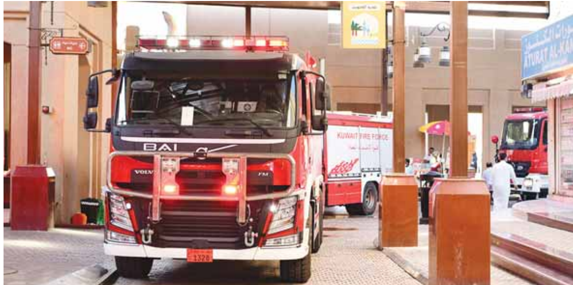
This handout photo released by Kuwait Fire Force shows fire engines at the Mubarakia Market where a fire was reported.