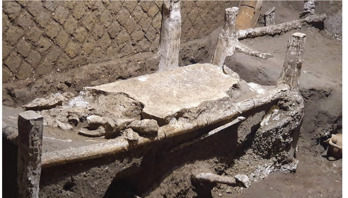
These photos show "The room of Slaves", an exceptionally well-preserved room for the slaves who worked in Villa Civita Giuliana in Pompeii.