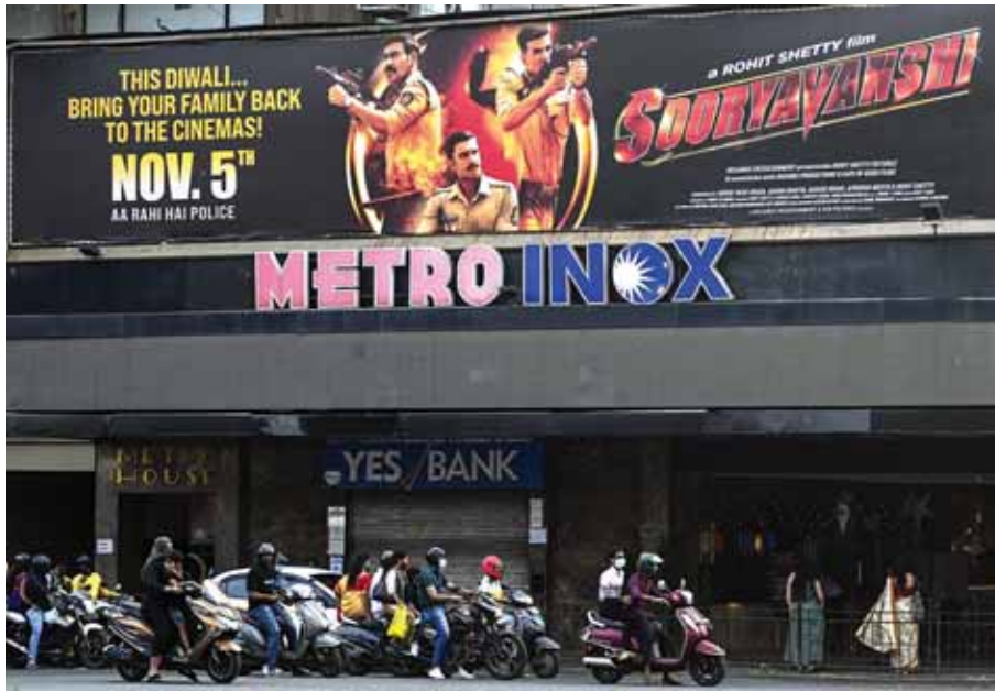
Vehicles drive past a cinema featuring a poster of the new Bollywood film 'Sooryavanshi' in Mumbai.

The industry is hoping for a rebound with theatres back in business across the country, most recently in Mumbai, capital of Bollywood, the world's most prolific film industry. First out of the blocks on Friday, just in time for the Diwali festival weekend-traditionally a time for blockbuster releases—was "Sooryavanshi", the first marquee Bollywood film to be released on the big screen in 18 months. Fans danced and chanted the name of the action caper's star Akshay Kumar—battling a terrorist sleeper cell in Mumbai—with one even baking a chocolate cake embossed with the name of the movie. "We have been