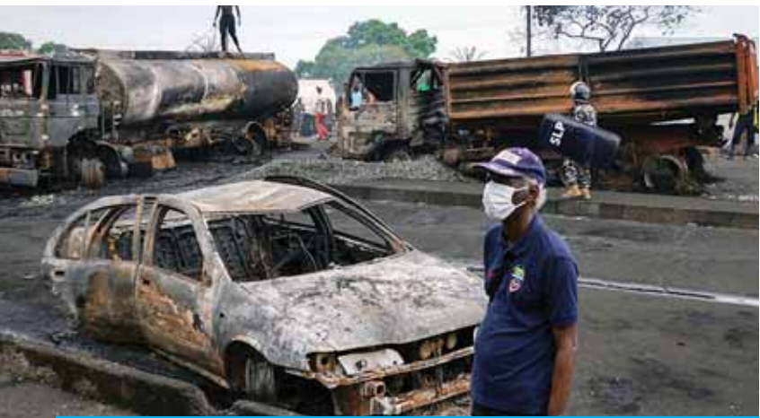
FREETOWN: A man stands near burnt vehicles yesterday following a massive explosion that has killed at least 92 people.