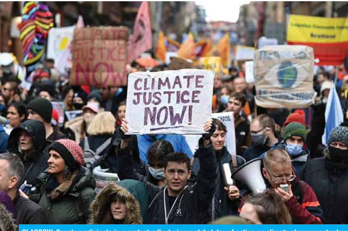
GLASGOW: People participate in a protest rally during a global day of action on climate change yesterday during the COP26 UN Climate Change Conference.

Protesters hit Glasgow streets as part of global climate rallies