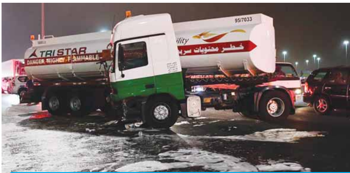
This handout photo released by Kuwait Fire Force shows a fuel truck that was involved in an accident on Sixth Ring Road.