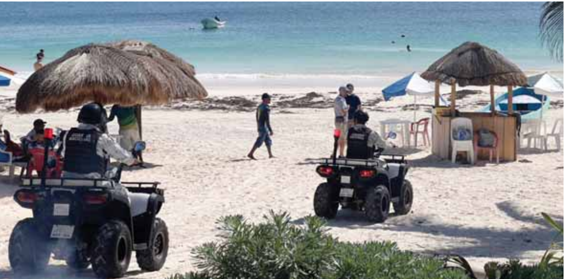
TULUM: Police officers patrol Tulum beach, near the Pre-Columbian Mayan archaeological site of Tulum, close to Mexico's Caribbean beach resort of Tulum, in the Mayan Riviera, Quintana Roo State.