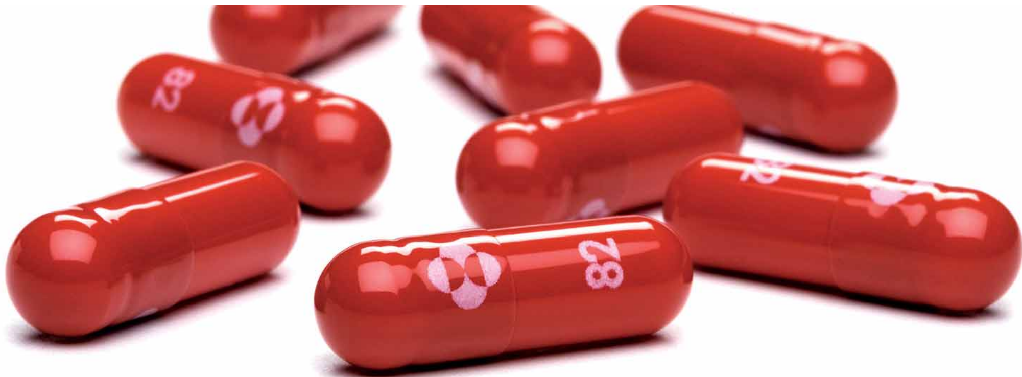
WASHINGTON: Photo shows capsules of the antiviral pill Molnupiravir. Britain on November 4, 2021, approved the use of Merck's antiviral pill to treat patients suffering from mild to moderate COVID-19.