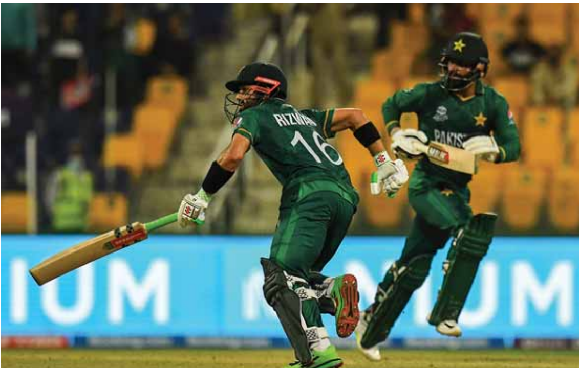
ABU DHABI: Pakistan's Mohammad Rizwan (left) with Mohammad Hafeez run between the wickets during the ICC men's Twenty20 World Cup cricket match between Namibia and Pakistan at the Sheikh Zayed Cricket Stadium in Abu Dhabi on November 2, 2021.

"To be honest, when it comes to a cricket match we don't think about who we want to play," said 41-year-old Hafeez yesterday on the eve of their match with Scotland. "Whoever comes we are ready for that as our confidence is high, we are shaping up well and we are performing well. But first we have a game against Scotland so we need to take them on with the same intensity and confidence. The goal is to win the Cup for the nation and we are close to that."