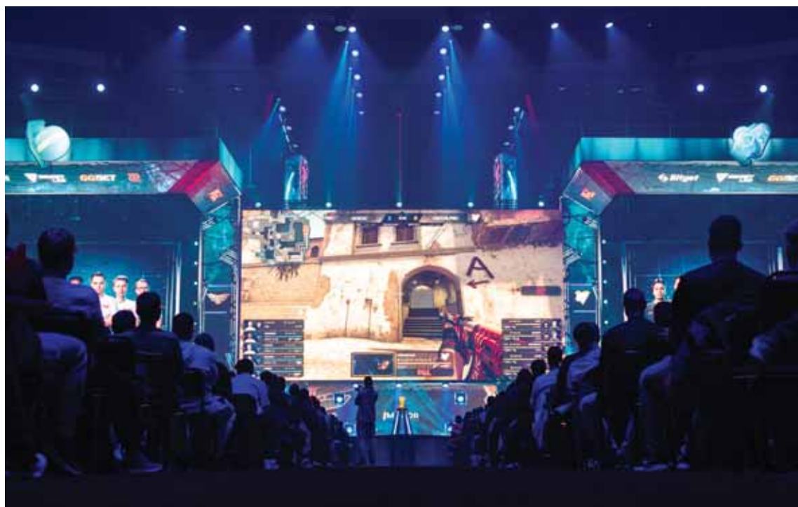
STOCKHOLM: Supporters attend the match between team Heroic and team Virtus Pro at the PGL Counter-Strike-Major event in Stockholm on November 4, 2021.

"It's like sports, it's above all a spectacle. Even if esports is the fruit of the digital revolution, and as such, can take place online, it is still the case that in person we find the social passions tied to traditional sports," Besombes added. "To be able to live vicari-