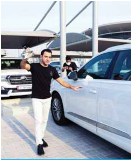
DOHA: Qatar's Al-Sadd football club's Spanish coach Xavi Hernandez bids farewell in the Qatari capital on Friday ahead of his return to Barcelona.

His passing style was seen as the embodiment of Guardiola's "tiki-taka" team that won the treble in 2009. "One of the greatest midfield maestros of all time, he helped redefine the art with his creative mind, pinpoint passing and sublime ability to read the game," Barca said in their statement, heralding the return of "an absolute legend". Al Sadd, which Xavi had coached since 2019, hours earlier said they had reached an agreement with Barca and