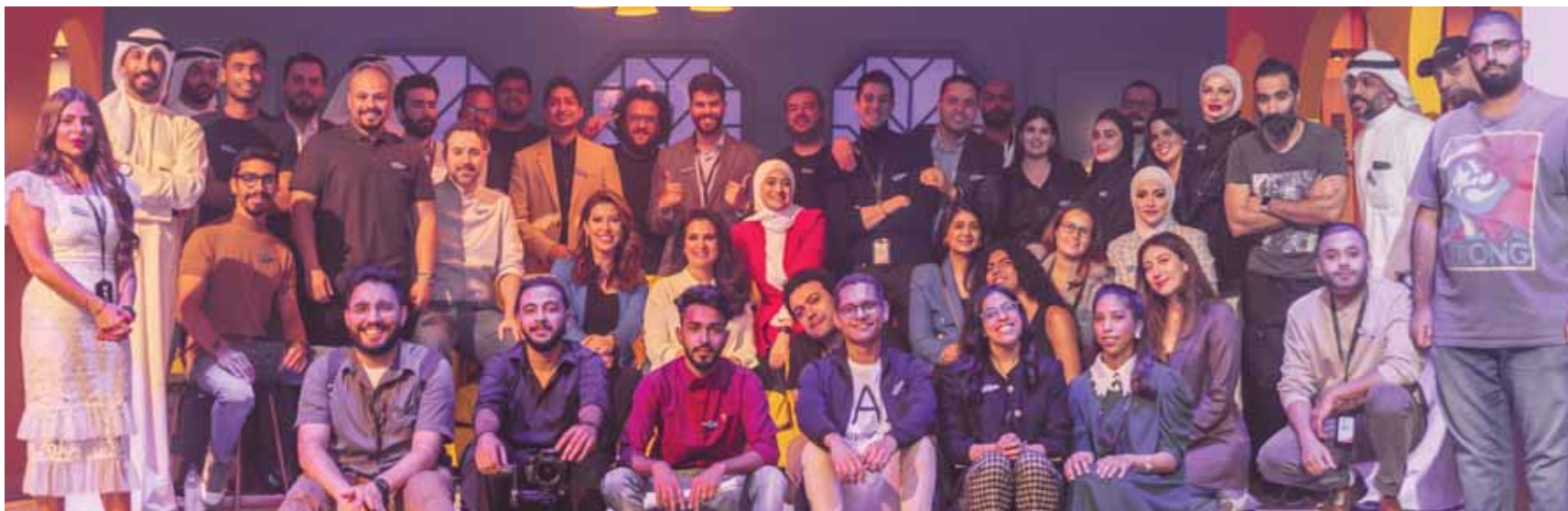
A group picture taken during the launch event.

Founded in July 2020, VO nurtures and supports Kuwaiti talents and inspiring initiatives in various fields including entrepreneurship. The platform launched its all-inclusive creative hub in May 2021 to empower and express their ideas, and is currently establishing an academic program for Kuwaiti youth and a 'smart' app to nurture their talents while promoting their creative productions on a seamless, high-tech and efficient digital platform.