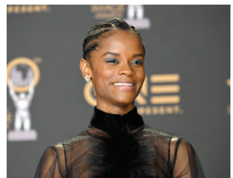
In this file photo Letitia Wright attends the 50th NAACP Image Awards at Dolby Theatre in Hollywood, California.

Production of Marvel's "Black Panther" sequel is being halted to allow star Letitia Wright to recover from an on-set injury sustained in August, entertainment publications reported on Friday. Wright played Shuri in 2018's