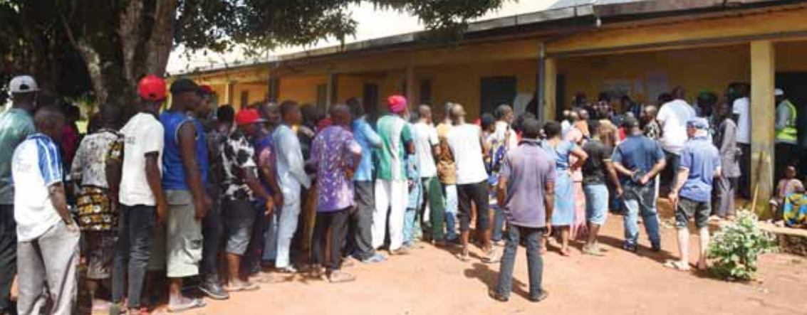
ISUOFIA, Nigeria: Voters queue to vote at a polling station during the Anambra State governorship election at Isuofia, southeast Nigeria yesterday.