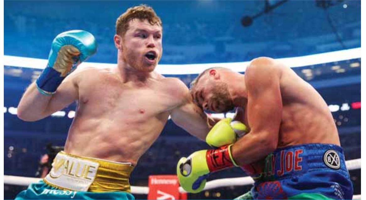
ARLINGTON: In this handout photo provided by Matchroom Boxing, Mexican boxer Saul "Canelo" Alvarez (left) throws a jab at British boxer Billy Joe Saunders during their super middleweight title fight at the AT&T Stadium in Arlington, Texas on Saturday.

Alvarez has now beaten seven English challengers in his career. That streak began with a points decision against Matthew Hatton when Alvarez was 20 years old in 2011, continued through