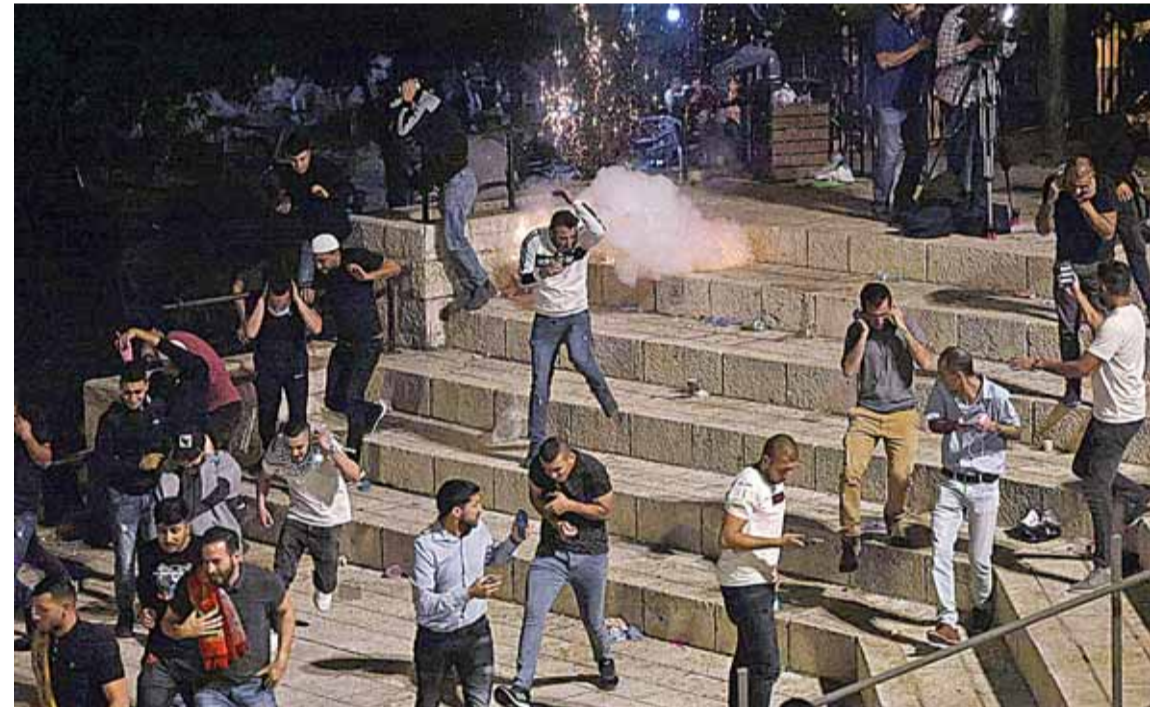
JERUSALEM: Israeli forces fire stun grenades at Palestinians outside the Damascus Gate in Jerusalem's Old City Saturday.

Bo, a black-and-white Portuguese water dog, was a gift to the Obamas from senator Edward Kennedy, and was chosen due to the breed's hypoallergenic coat. He appeared regularly at White House events, particularly the annual Easter Egg Roll, met the Pope, visited children in hospital and flew on Air Force One.