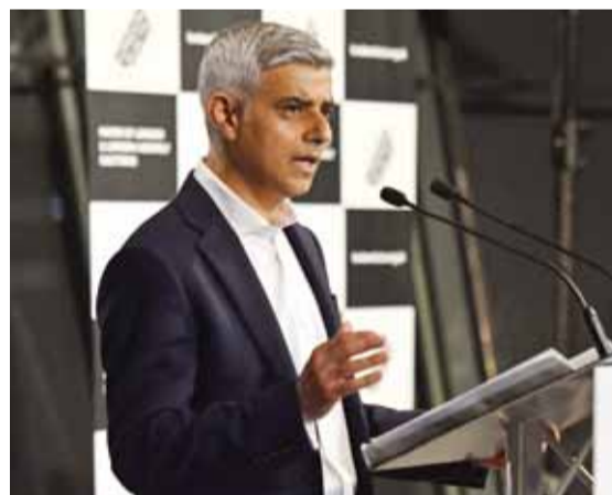
LONDON: Sadiq Khan gives his acceptance speech after being declared the winner of the London Mayoral election at City Hall in London Saturday winning his second term as London mayor.

Born in London in 1970 to parents who had