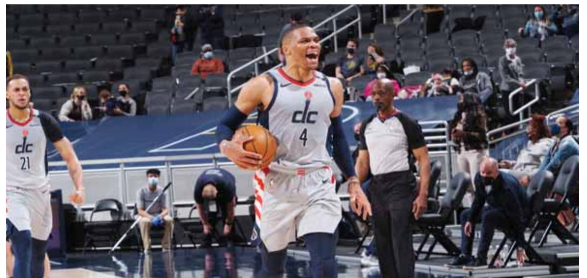
INDIANAPOLIS: Russell Westbrook #4 of the Washington Wizards reacts after blocking a shot to win the game against the Indiana Pacers on Saturday at Bankers Life Fieldhouse in Indianapolis, Indiana.

Westbrook gets a first chance to overtake Robertson tonight when the Wizards play the Hawks