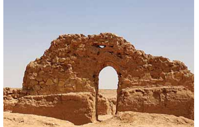
Pictures show views of the Al-Aqiser archeological site in Ain Tamr near Karbala in Iraq, which includes what has been described as one of the oldest eastern Christian churches.

One of the world's oldest churches is crumbling deep in Iraq's desert, another victim of years of conflict, government negligence and climate change in a country with a rich heritage. After Pope Francis made a historic visit to Iraq in March, many Iraqis hoped that busloads of tourists would flock to Al Aqiser church southwest of the capital Baghdad. But in a country that has been battered by consecutive conflicts and economic crises, the church-like Iraq's numerous Christian, Islamic and Mesopotamian relics has been left to weather away.