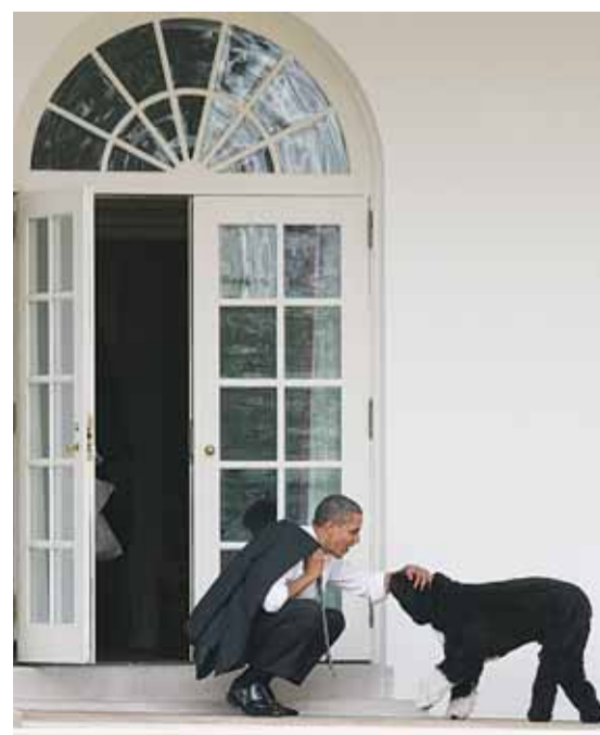
WASHINGTON: In this file photo, former US President Barack Obama pets his dog Bo outside the Oval Office of the White House in Washington, DC.