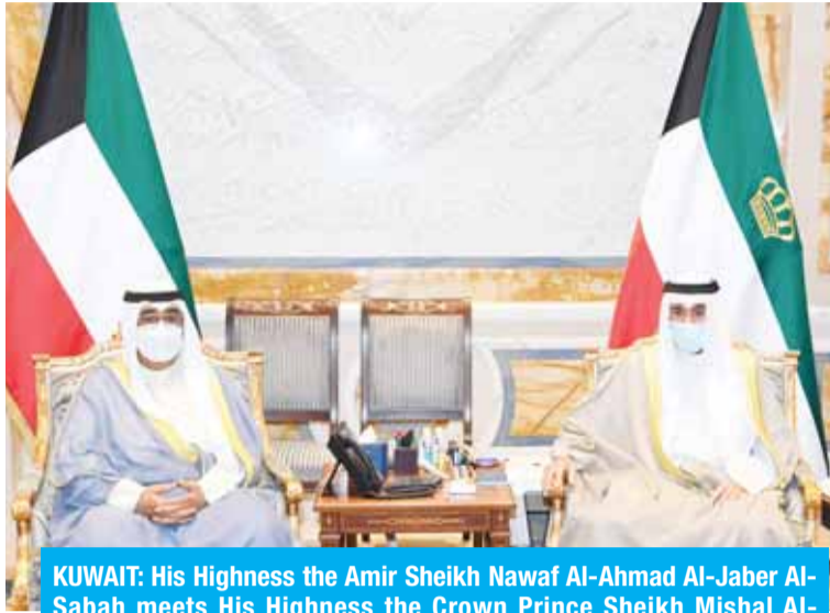
KUWAIT: His Highness the Amir Sheikh Nawaf Al-Ahmad Al-Jaber Al-Sabah meets His Highness the Crown Prince Sheikh Mishal Al-Ahmad Al-Jaber Al-Sabah.