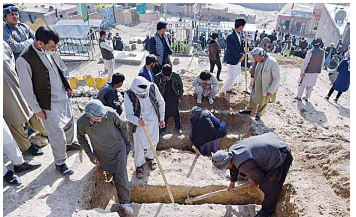
KABUL: Mourners and relatives dig graves for girls, who died in Saturday's multiple blasts outside a girls' school, during the burial at a desolate hilltop cemetery in Dasht-e-Barchi on the outskirts of Kabul yesterday.

The United States was supposed to have pulled all forces out by May 1 as agreed with the Taliban last year, but Washington pushed back the date to September 11 — a move that angered the insurgents. The leader of the Taliban, Hibatullah Akhundzada, reiterated in a message released ahead of Eid that any delay in withdrawing the troops was a "violation" of that deal. "If America again fails to live up to its commitments then the world must bear witness and hold America accountable for all the consequences," Akhundzada warned in yesterday's message. He also said that the coun-