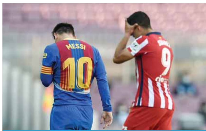
BARCELONA: Barcelona's Argentinian forward Lionel Messi and Atletico Madrid's Uruguayan forward Luis Suarez leave the pitch during the Spanish league football match FC Barcelona against Club Atletico de Madrid at the Camp Nou stadium in Barcelona on Saturday.

Messi was repeatedly knocked over in the opening few minutes before Gerard Pique went through the back of Suarez, both teams scrapping for control. Atletico slowly took charge, helped by the departure of Sergio Busquets, who was replaced