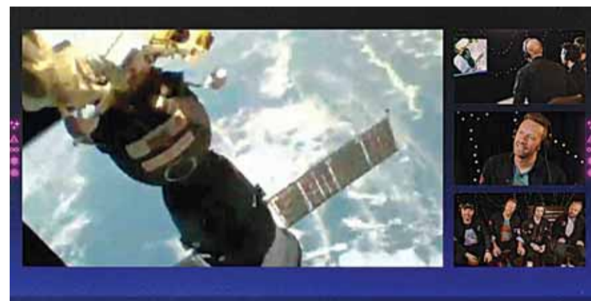
Members of Coldplay watch the view from the window of International Space Station during an interview with French ESA astronaut Thomas Pesquet (not pictured), in this still image from an undated handout video obtained by REUTERS.