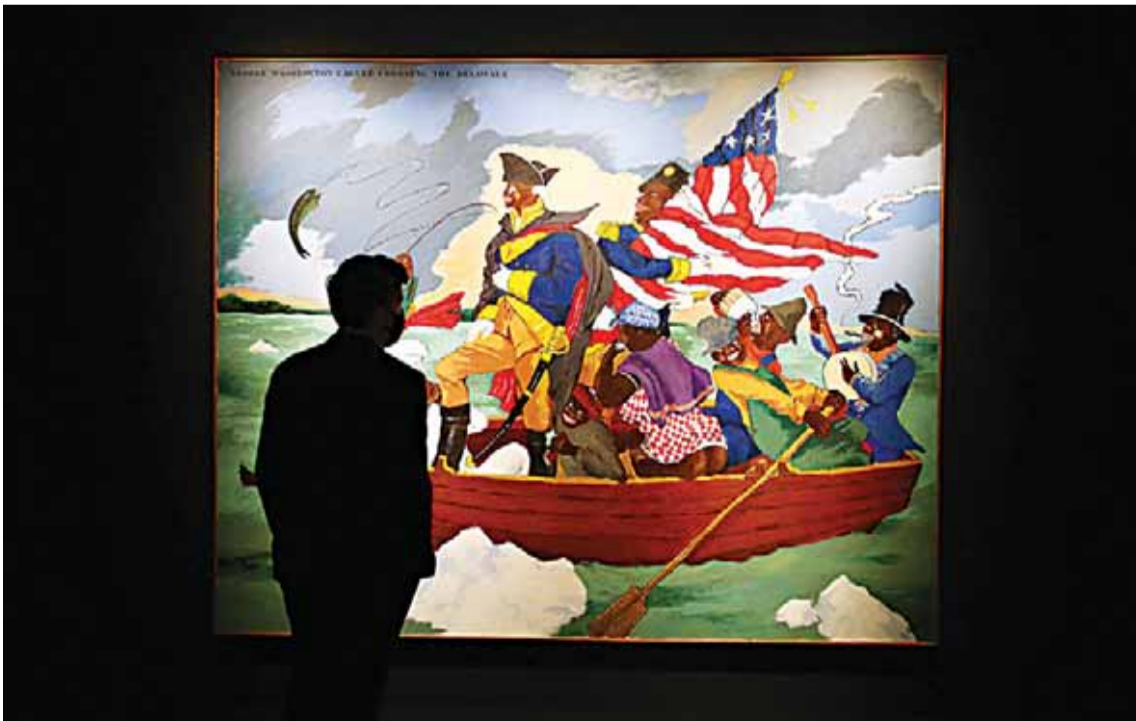
'George Washington Carver Crossing the Delaware: Page from an American History Textbook' by Robert Colescott is on display during Sotheby's NY press preview of the upcoming Contemporary Art Evening Auction.

The season was Jordan's second at UNC, and the season after a freshman Jordan helped take the Tar Heels to the 1982 national championship over a Georgetown team that featured Patrick Ewing. The same jersey had brought $63,500 when it was auctioned in 1999, and Heritage had expected it to go for about $1 million in its Spring Sports Catalog Auction. The previous high for a Jordan jersey was set in October when a Chicago uniform worn by the NBA icon—who won six championships with the Bulls—sold for $480,000. That jersey and shorts kit was from the 1986-87 NBA season when Jordan was the league's leading scorer but the Bulls were swept by the Boston Celtics in the first round of the playoffs.