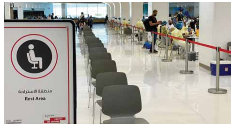
KUWAIT: Mall workers wait to receive their COVID-19 vaccine shot at the Avenues Mall yesterday.

who continue to perform their duties according to the best quality standards.