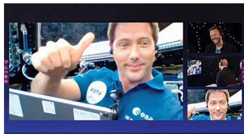
French ESA astronaut Thomas Pesquet gestures during an interview with members of Coldplay.

Coldplay gave new meaning to the idea of a single launch, playing new song "Higher Power" for the first time during a video link-up with French astronaut Thomas Pesquet. Pesquet spoke with the British group from the International Space Station. "We sent you some music, because right now we aren't able to play for anyone on Earth, so we thought we would just play for you," singer Chris Martin said before playing the song late Thursday. "This is the premiere for the whole... galaxy," he added, saying the song was about "trying to find the astronaut in all of us, the person who can do amazing things." The band took the opportunity to quiz Pesquet about his time on the station, including how he unwinds. "In the evenings when everyone goes to bed... I put on my headset and play some music and just float... it's really cool, you feel completely free," Pesquet said. Asked by guitarist and sci-fi fan Guy Berryman what movies get wrong about being on a space station, Pesquet said the biggest mistake was