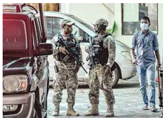
MALE: Maldives National Defense Force (MNDF) personnel stand guard in the capital Male yesterday following the May 6 attempted assassination of Maldives' former president Mohamed Nasheed who is recovering in hospital.

Chinese authorities had downplayed the risk, however. "The probability of causing harm to aviation activities or (on people and activities) on the ground is extremely low," foreign ministry spokesman Wang Wenbin said Friday.