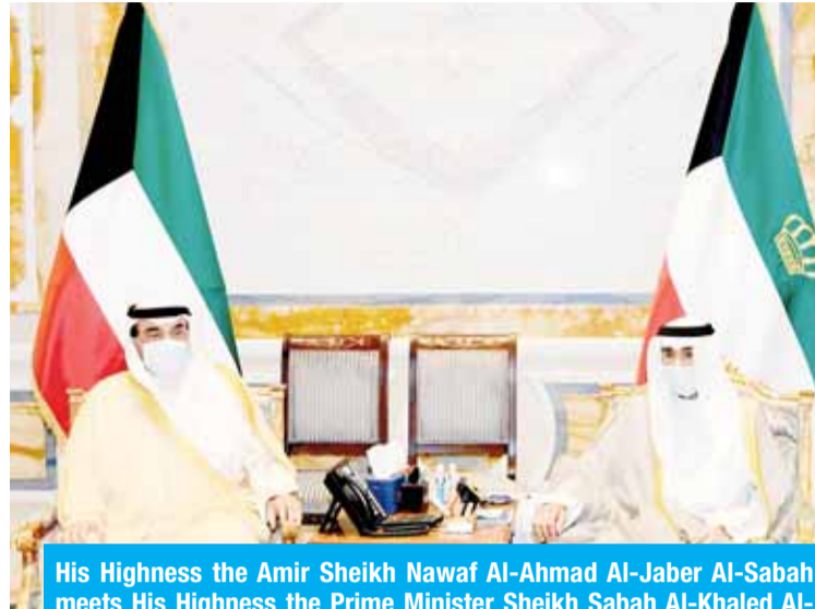
His Highness the Amir Sheikh Nawaf Al-Ahmad Al-Jaber Al-Sabah meets His Highness the Prime Minister Sheikh Sabah Al-Khaled Al-Hamad Al-Sabah.