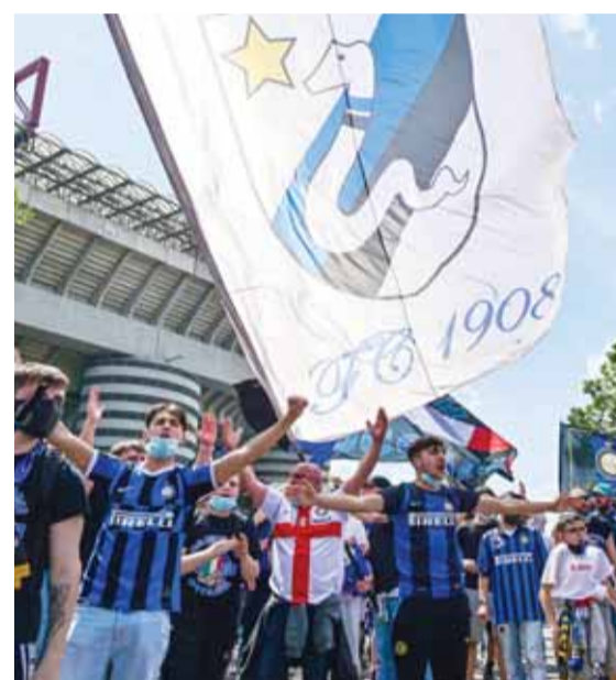
MILAN: Inter Milan supporters gather to celebrate prior to the Italian Serie A football match Inter Milan vs Sampdoria on Saturday at the San Siro stadium in Milan.

Polish midfielder Piotr Zielinski finished off a Giovanni Di Lorenzo pull-back after 15 minutes and then provided the cross for Nigerian international