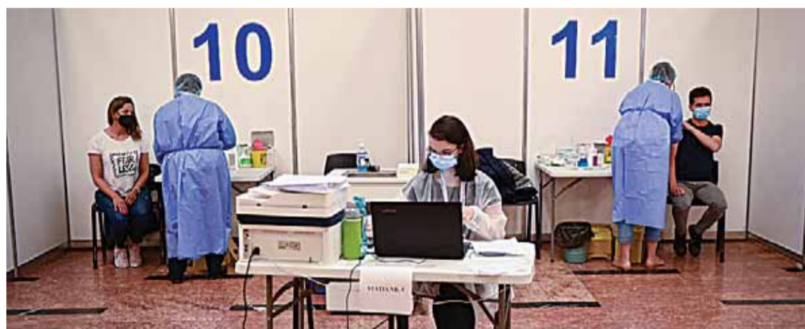
Medical staff vaccinate resident during the vaccination marathon organized at the "Bran Castle" in Bran village.