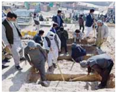
Afghans bury dead from bloody school blasts as toll rises to 50