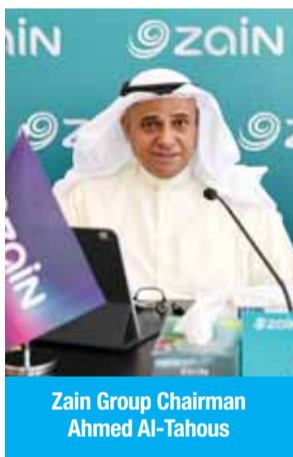
Zain Group Chairman Ahmed Al-Tahous

Net income for the quarter reached KD 45 million ($147 million), down 5 percent Y-o-Y reflecting an earnings per share of 10 fils ($0.03). Significantly, Zain Group net income grew operationally by 4 percent Y-o-Y for Q1, 2021, when excluding the one-time gain from the sale and lease back of towers in Kuwait during Q1 2020. (See Page 9)