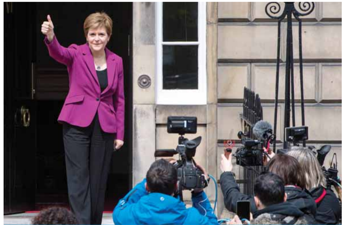
EDINBURGH: Scotland's First Minister and leader of the Scottish National Party (SNP), Nicola Sturgeon gives a thumbs-up on the steps of her official residence Bute House in Edinburgh yesterday following the party's landslide victory in the Scottish parliament elections.