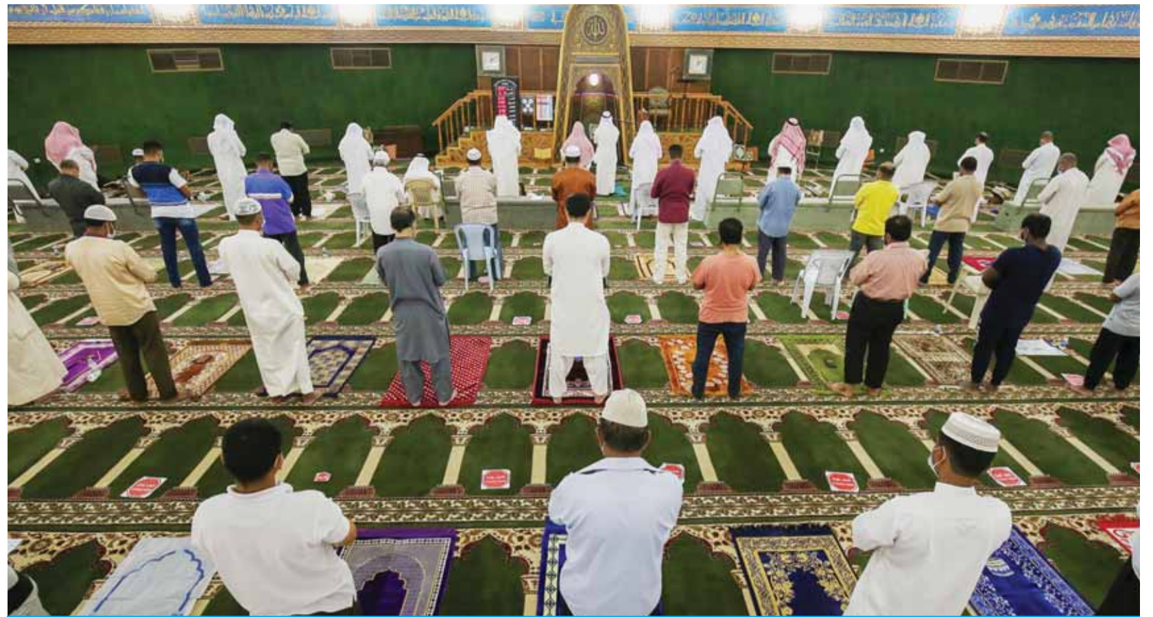
KUWAIT: Muslim men pray at Fatmah Mosque in the Kuwait City just before daybreak early yesterday, during the night of the 27th day of the holy month of Ramadan, widely presumed as Laylat Al-Qadr.