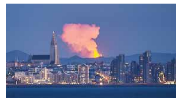
The skyline of the Icelandic capital Reykjavik with the glow from the lava coming out of a fissure near the Fagradalsfjall on the Reykjanes Peninsula behind.

She was among more than 2,500 people at the site on Saturday, kept back some 500 meters (yards) from the crater — a safety radius that varies from 400 to 650 meters depending on the wind speed. "It's not every day