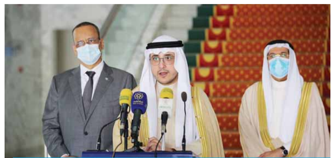
NOUAKCHOTT: Kuwait's Foreign Minister Sheikh Dr Ahmad Nasser Mohammad Al-Sabah speaks during a press conference in Nouakchott late Saturday.

During his visit, Sheikh Dr Ahmad also held talks with Mauritania Foreign Minister Ismail Ould Cheikh Ahmad, which highlighted bilateral relations. The two ministers also delved into ways of boosting cooperation and development in various fields, including discussion on the latest developments in the region and international arena. Furthermore, Sheikh Dr Ahmad held talks with Mauritania's Prime Minister Mohamed Ould Bilal, focusing on bilateral relations and aiming to bolster ties across numerous fields. The Kuwaiti foreign minister's official visit to the West African nation came as part of a comprehensive tour of the region.