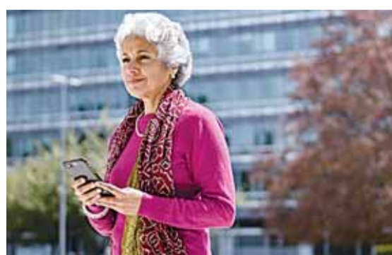
GENEVA: World Health Organization's chief scientist Soumya Swaminathan checks her smartphone during an interview with AFP in Geneva Saturday.

He is known internationally as a champion in the fight against climate change and rising sea levels that he says threaten to submerge the nation of 1,192 coral islands.