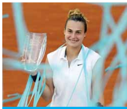
MADRID: Belarus' Aryna Sabalenka poses with her trophy after beating Australia's Ashleigh Barty during their 2021 WTA Tour Madrid Open tennis tournament singles final match at the Caja Magica in Madrid on Saturday.

The Eastern Conference-leading Philadelphia 76ers romped past already eliminated Detroit 118-104. But the Brooklyn Nets had to battle for a 125-119 victory over the Denver Nuggets that put them half a game ahead of the Milwaukee Bucks for second in the East.