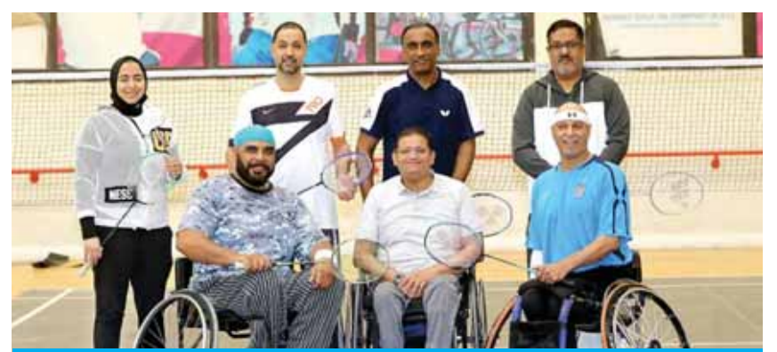
KUWAIT: Kuwait's disabled badminton team and staff.