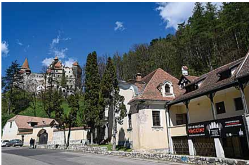
A banner reading in Romanian "Who's afraid of vaccine" and depicting syringes as vampire fangs advertises the vaccination marathon organized at the "Bran Castle" (in background) in Bran village.