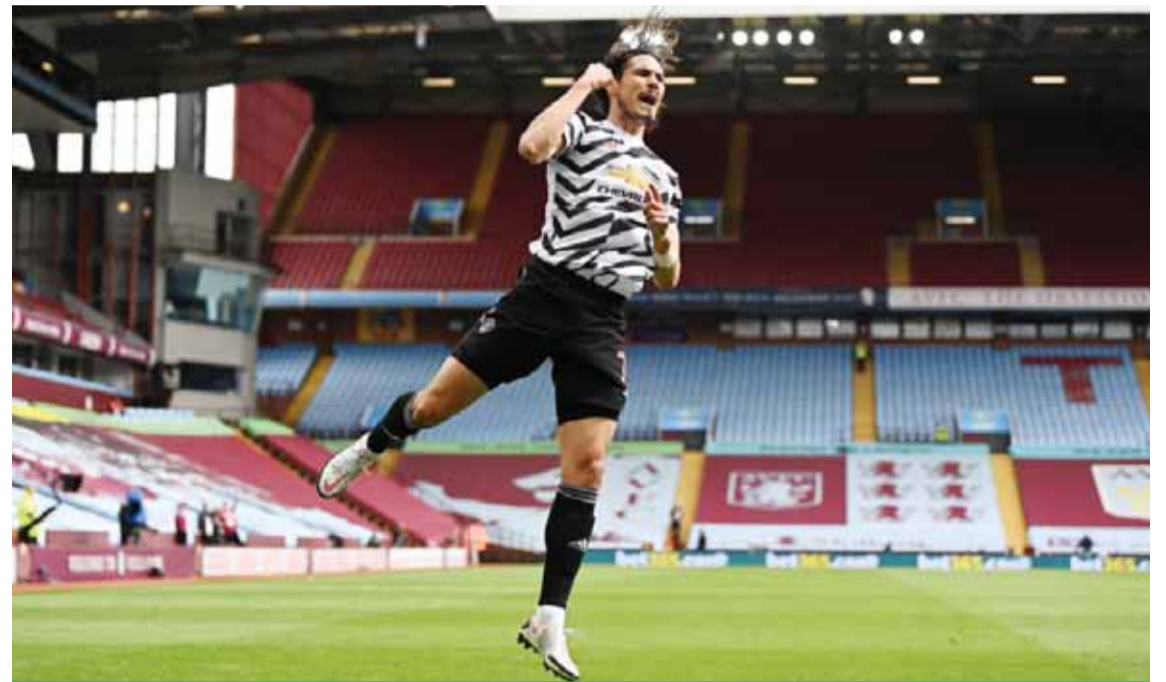
BIRMINGHAM: Manchester United's Uruguayan striker Edinson Cavani celebrates scoring his team's third goal during the English Premier League football match between Aston Villa and Manchester United at Villa Park in Birmingham, central England yesterday.

Alonso slotted home the winner in stoppage time after Timo Werner pulled the ball back to complete the