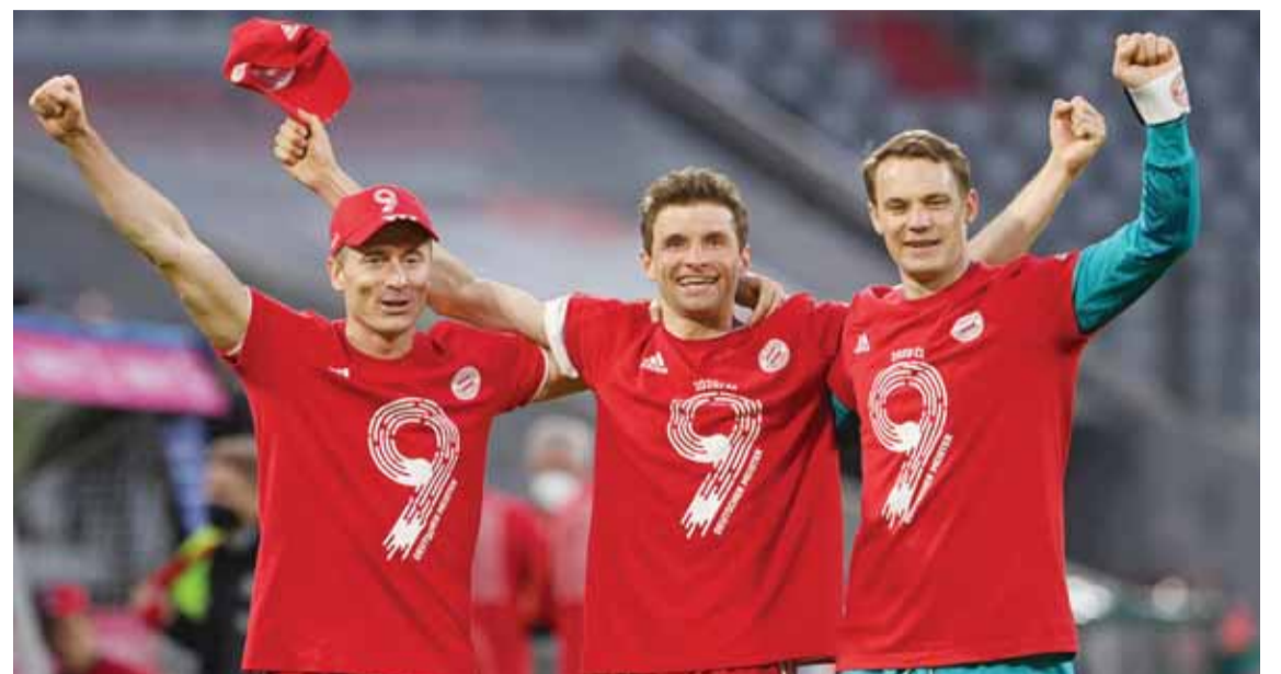
MUNICH: (From left) Bayern Munich's Polish forward Robert Lewandowski, Bayern Munich's German forward Thomas Mueller and Bayern Munich's German goalkeeper Manuel Neuer celebrate after the German first division Bundesliga football match FC Bayern Munich v Borussia Moenchengladbach in Munich, southern Germany on Saturday.

Reus span out of Lukasz Piszczek's pass, sprinted behind the defence and took a beautiful back-heeled ball from Thorgan Hazard before sweeping his shot past Leipzig goalkeeper Peter Gulacsi.