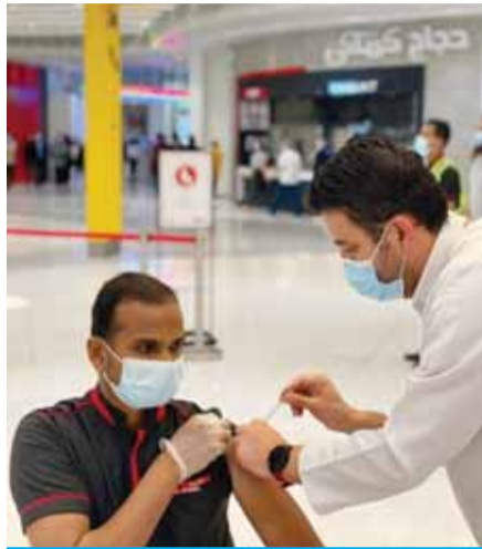
A health worker administers a COVID-19 vaccine shot to a mall employee.