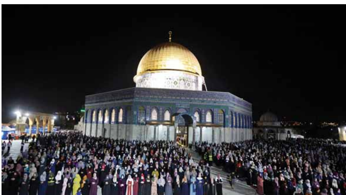
JERUSALEM: Palestinian devotees pray on Laylat Al-Qadr (Night of Destiny) outside the Dome of the Rock in Jerusalem's Al-Aqsa Mosque compound during the holy month of Ramadan Saturday.