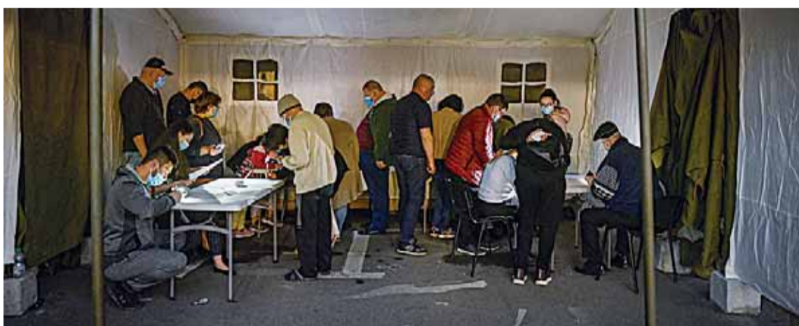
People inside a tent use mobile phones' light to fill-in forms prior being vaccinated during the vaccination marathon organized at the "Bran Castle" in Bran village.

But she added that it would still be difficult to reach people living in the many areas without local doctors. Almost 3.6 million Romanians of the country's 19 million people have received at least one vaccine dose, with authorities aiming for five million by June. —AFP