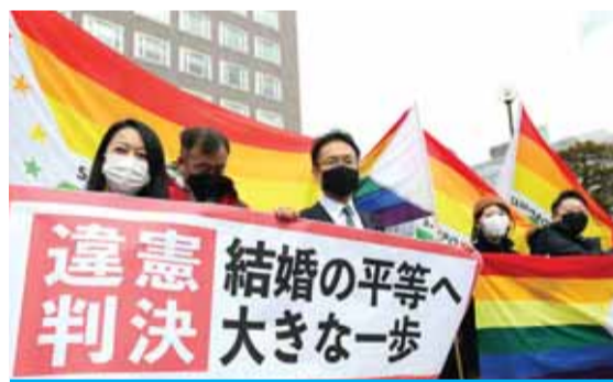
SAPPORO, Japan: Supporters hold the "unconstitutional decision" flag in front of the Sapporo District Court in Sapporo, Hokkaido prefecture yesterday.

TOKYO: Japan's failure to recognize same-sex marriage is unconstitutional, a court ruled yesterday, in a landmark first verdict on the issue that campaigners welcomed as a major victory. Lawyers for plaintiffs in the case said the ruling should pile pressure on lawmakers to accept same-sex unions, but the path to any such recognition is still likely to be lengthy.