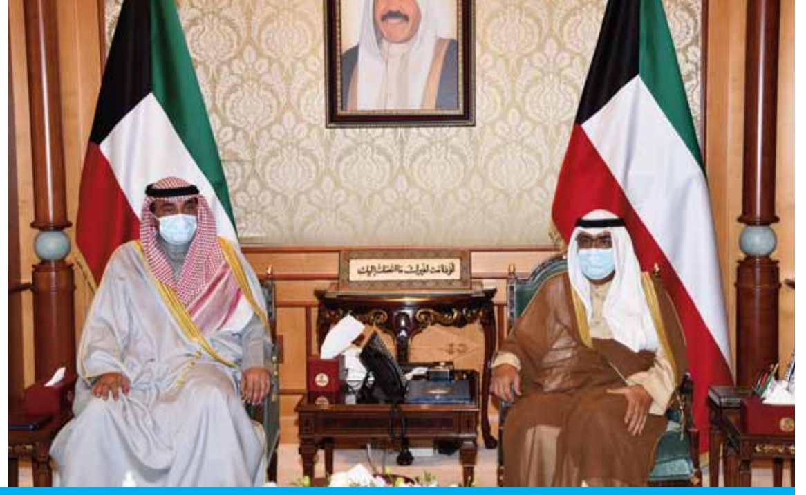
KUWAIT: His Highness the Deputy Amir and Crown Prince Sheikh Mishal Al-Ahmad Al-Jaber Al-Sabah received yesterday National Assembly Speaker Marzouq Ali Al-Ghanem. His Highness the Deputy Amir also received His Highness the Prime Minister Sheikh Sabah Al-Khaled Al-Hamad Al-Sabah.