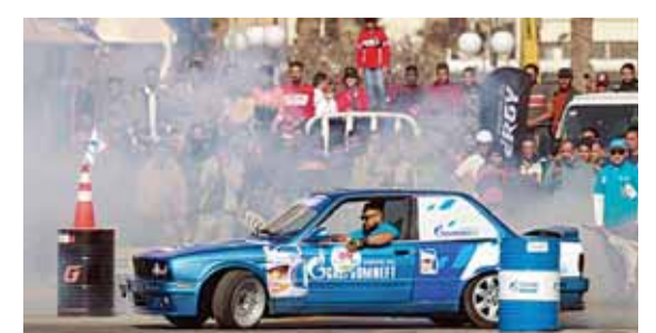
BENGHAZI: Libyans watch a driver put his drifting skills to the test during a competition in the coastal city of Benghazi, on March 12, 2021.

Libya's new interim Prime Minister Abdul Hamid Dbeibah was sworn in this week, pledging to re-unite the country and steer it towards December elections. At the drifting championship, organized under the theme "unity and peace for Libya", judges rated the competitors on their style, technique and vehicle speed.