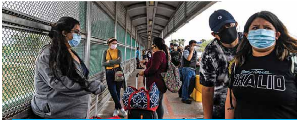
Migrants mostly from Central America wait in line to cross the border at the Gateway International Bridge into the US from Matamoros, Mexico to Brownsville, Texas.

Also guaranteed able to stay are children who cross the border without parents. According to social workers in Matamoros, the Mexican city opposite Brownsville, the kids are brought by parents or relatives to the border and sent across alone, some as young as six. Once across, they too are processed by CBP, and then handed over to the Department of Health and Human Services, which