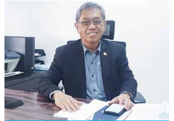
KUWAIT: Philippine Labor Attache to Kuwait Nasser Mustafa.

Provisions in the tripartite contract include providing the housemaid with decent and appropriate housing equipped with all the necessities, providing suitable food and clothing, providing medical treatment in case of sickness pursuant to the healthcare insurance system of Kuwait, salary must be paid at the end of the month - not less than the designated amount signed by both parties, compensating the housemaid in case of injury while during work, employers must issue a valid residency for the duration of contract, handle all the expenses to bring the housemaid, and in case of death, the employer must also bear the expenses of the deceased body.