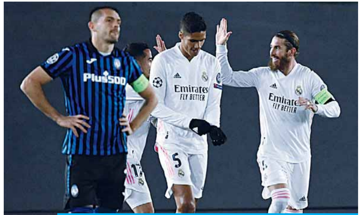
MADRID: Real Madrid's Spanish defender Sergio Ramos (R) celebrates his goal during the UEFA Champions League round of 16 second leg football match between Real Madrid CF and Atalanta at the Alfredo di Stefano stadium in Valdebebas, on the outskirts of Madrid on Tuesday.

The goal killed Atalanta's belief and Vinicius almost added a second after half-time, only to prod wide after a surging run to the edge of Atalanta's six-yard box. But the warning was not heeded and Vinicius raced past Toloi, whose dangling leg made enough contact to concede the penalty, which