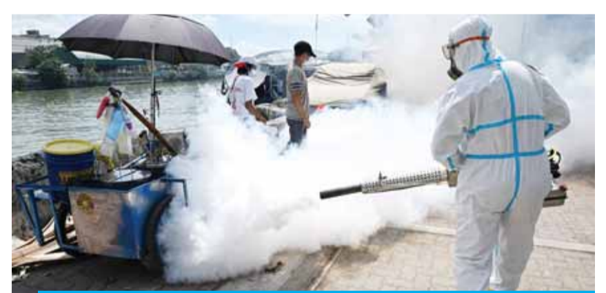
MANILA: A city employee disinfects a street at an informal settlers area on Tuesday.