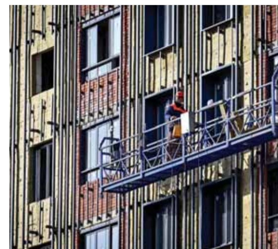
MOSCOW: A laborer works at a housing construction site of Granelle, a Moscow-based developer, in southwest Moscow. — AFP

Russian authorities have sounded the alarm over labor shortages, and President Vladimir Putin in January ordered the government to simplify entry requirements for migrant workers. In late December, Deputy Prime Minister for Construction and Regional Development Marat Khusnullin said that nearly 1.5 million migrants working in construction had not returned to Russia after border closures were put in place in March 2020. Granelle's Lychits said that roughly half of the company's workers now come from Russian provinces but their wages are up to 20 percent higher than those of foreign laborers. "The state is actively working to simplify procedures for attracting migrant workers, including issuing electronic permits," added Lychits. But progress has been slow. Only around 14,000 foreign workers were able to reach Russian construction sites between the end of 2020 and February thanks to the simplified procedures.—AFP