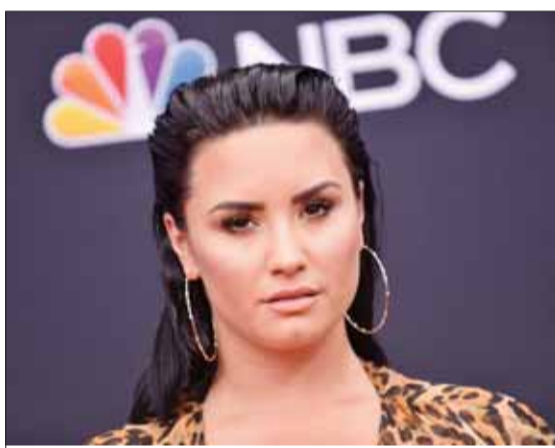
In this file photo Singer/songwriter Demi Lovato attends the Billboard Music Awards 2018 at the MGM Grand Resort International in Las Vegas, Nevad.