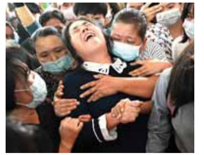
Myanmar's biggest town a battle zone as junta enforces martial law