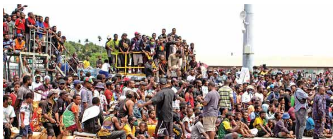
PORT MORESBY, PNG: This picture taken on March 14, 2021 shows a crowd of people - none wearing face masks, nor social distancing - gathered outside Jacksons International Airport in Port Moresby to bid farewell to the casket of Papua New Guinea's first prime minister Michael Somare, who died late February. — AFP

Officials in Queensland told AFP that about half the state's hospitalized COVID-19 patients had come from Papua New Guinea, while a recent batch of 500 tests sent from Port Moresby showed a 50 percent infection rate. Wong said vast nationwide memorial services this month for Papua New Guinea's first prime minister and "father of the nation" Michael Somare would likely contribute to the surge in cases. At one event in Port Moresby, throngs of people lined Independence Boulevard throwing flowers onto the passing motorcade carrying the body of the "Grand Chief" as it approached parliament. — AFP