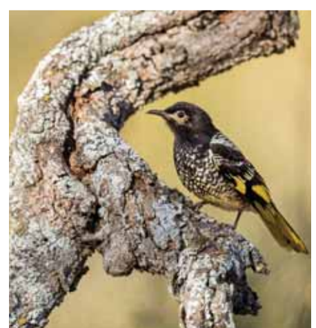
This undated handout photo shows a rare Australian songbird, a female regent honeyeater, at the Capertee National Park in New South Wales.