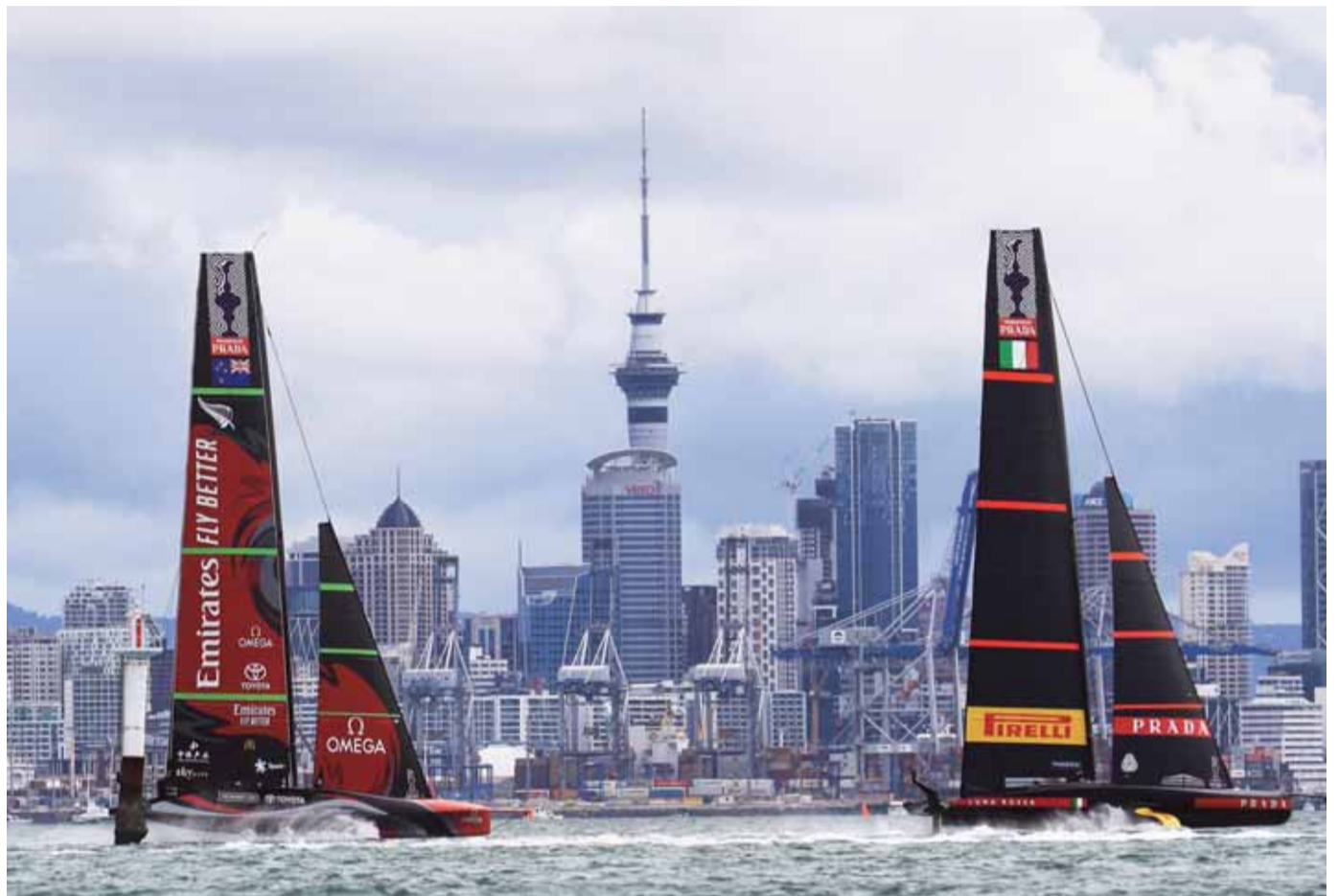
AUCKLAND: Italy's Luna Rossa (right) competes against Team New Zealand during day six of the America's Cup in Auckland yesterday.

But the day was essentially a victory lap for Team New Zealand, who cruised around the shore to give fans a better view of their hi-tech yacht