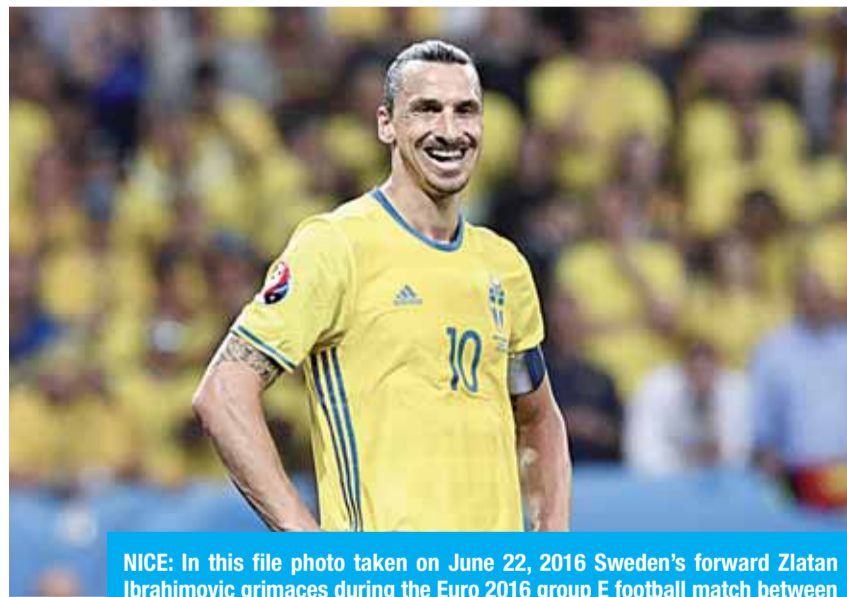
NICE: In this file photo taken on June 22, 2016 Sweden's forward Zlatan Ibrahimovic grimaces during the Euro 2016 group E football match between Sweden and Belgium at the Allianz Riviera stadium in Nice.

"So it's of course great that he wants to come back. In addition to what he