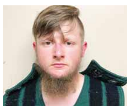
ATLANTA: This handout booking photo shows shooting suspect Robert Aaron Long.

they were praying for his recovery. "We never know when we're at the wrong place at the wrong time because this was so all of a sudden," she said. Police separately confirmed that four women had been killed in attacks on two other spas in the northeast of the city. Describing the scene in northeast Atlanta, the city police department said: "Upon arrival, officers located three females deceased inside the location from apparent gunshot wounds." While on the scene, officers were advised of shots fired across the street, where they found a fourth female victim. Police told