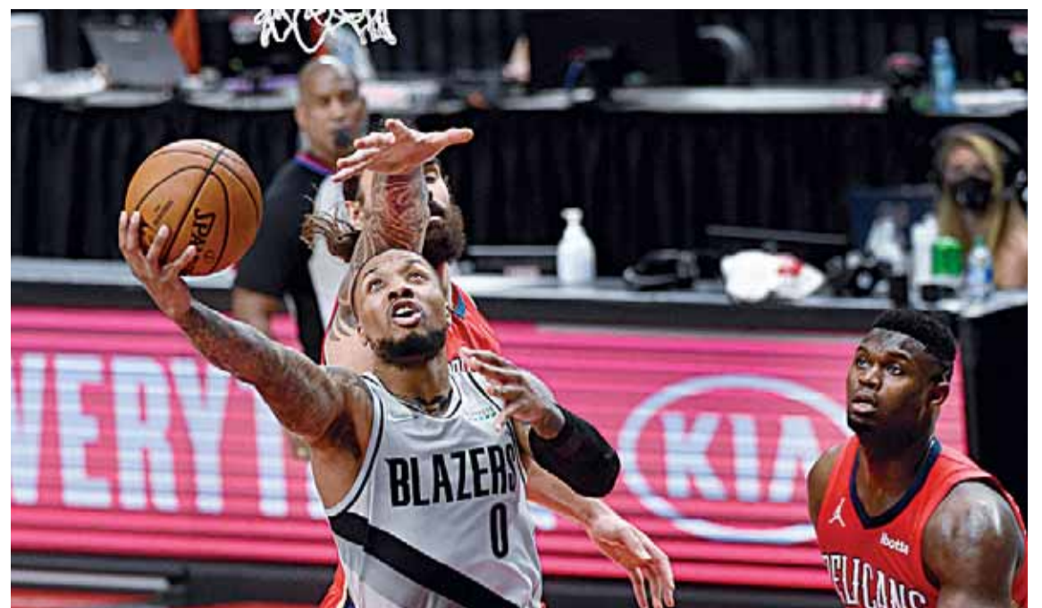
PORTLAND: Damian Lillard of the Portland Trail Blazers drives to the basket on Steven Adams of the New Orleans Pelicans as Zion Williamson looks on during the second half at Moda Center on Tuesday in Portland, Oregon.

Elsewhere Tuesday, the New York Knicks pushed the Eastern Conference-leading Philadelphia 76ers all the way before losing their road game 99-96. The Knicks, who ran the second-placed Brooklyn Nets close on Monday, led for long periods but were overpowered in the