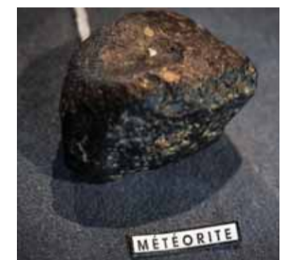
The meteor-known as Erg Chech 002—was discovered in May 2020 by researchers working in the Algerian Sahara desert.

Of the roughly 65,000 meteorites so far documented on Earth, only around 4,000 contain what is known as "differentiated matter". This means they came from celestial bodies large enough to have experienced tectonic activity. Of those 4,000, 95 percent come from just two asteroids. But Erg Chech 002 is among the remaining five percent. "It's the only one out of 65,000 meteorites that is like it is," said Barrat. "Such rocks were quite common at the very beginning of the history of the solar system."