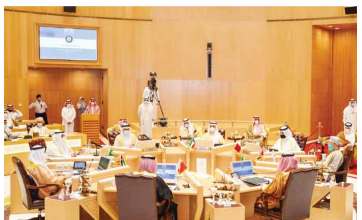
RIYADH: GCC foreign ministers attend the 147th session of the GCC ministerial council in Riyadh, Saudi Arabia yesterday.

The GCC ministers, in their statement, noted the GCC unwavering stances with respect of the rela-