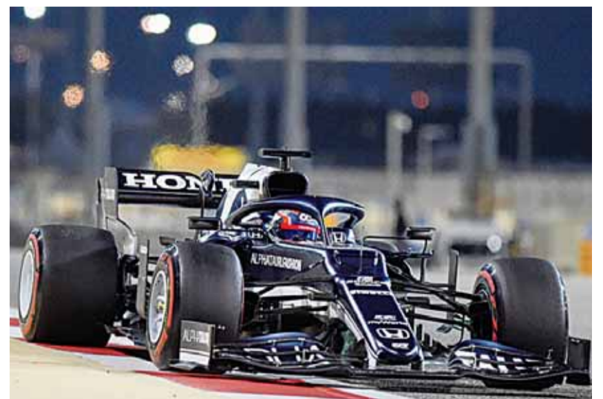
SAKHIR: AlphaTauri's Japanese driver Yuki Tsunoda drives during the third day of the Formula One (F1) pre-season testing at the Bahrain International Circuit in the city of Sakhir on March 14, 2021.

The diminutive 1.59 metre (5ft 3in) Tsunoda admitted in December he would have to hit the gym over the winter to cope with the Formula