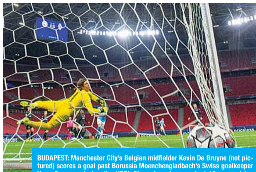
BUDAPEST: Manchester City's Belgian midfielder Kevin De Bruyne (not pictured) scores a goal past Borussia Moenchengladbach's Swiss goalkeeper Yann Sommer during the UEFA Champions League, last 16, second-leg football match between Manchester City and Borussia Moenchengladbach at the Puskas Arena in Budapest on Tuesday.

has transformed Guardiola's men into the complete team this season as they remain on course for an unprecedented quadruple of Premier League, Champions League, FA Cup and League Cup.