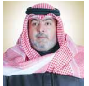
Minister of Interior Sheikh Thamer Ali Sabah Al-Salem Al-Sabah

During the meetings, all sides discussed a number of subjects of mutual grounds and a coordination plan to enhance cooperation between Kuwait's institutional security and its embassies abroad in order to increase facilitation to Kuwaitis. All ambassadors expressed thanks to the Minister of Interior for his warm hospitality and efforts. —KUNA