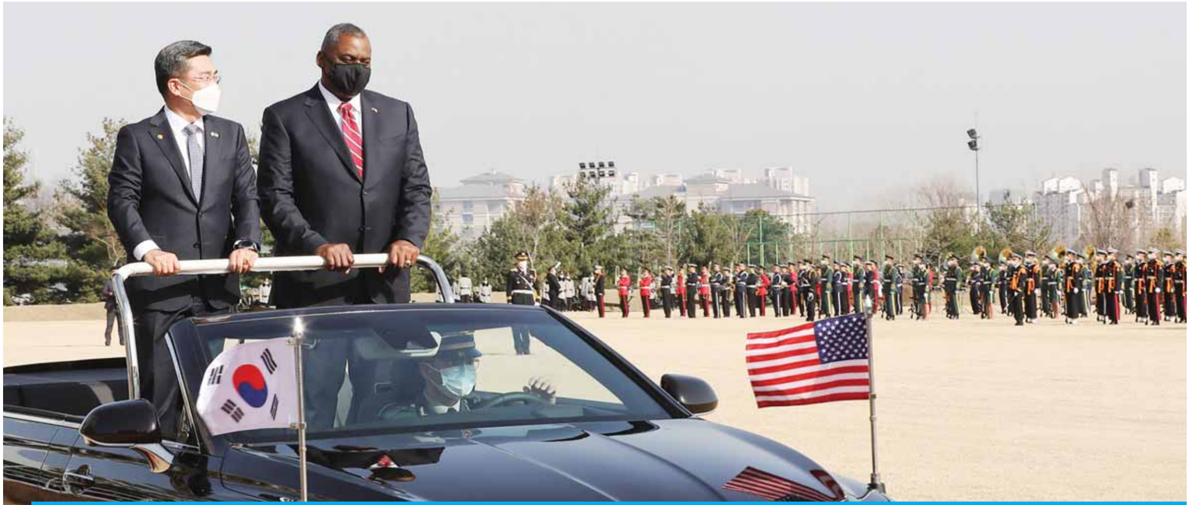
SEOUL: US Secretary of Defense Lloyd Austin (right) talks with South Korean Defense Minister Suh Wook (left) as they inspect honor guards during a welcoming ceremony at the Defense Ministry in Seoul yesterday.