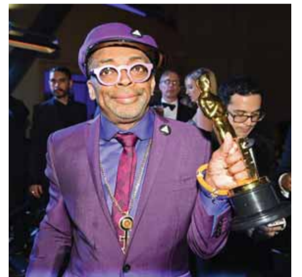
In this file photo Best Adapted Screenplay winner for "BlacKkKlansman" Spike Lee attends the 91st Annual Academy Awards Governors Ball at the Hollywood & Highland Center in Hollywood, California.

Lee exploded on to the film scene at Cannes in 1986 with "She's Gotta Have It", which took home the Youth Award. Shot on a shoestring in New York, the story of a young New Yorker trying to choose between three men has become a cult classic and was recently remade as a Netflix series. When he returned to the Cote d'Azur three years later, he was in the main competition with "Do The Right Thing", his landmark film about one sweltering day of