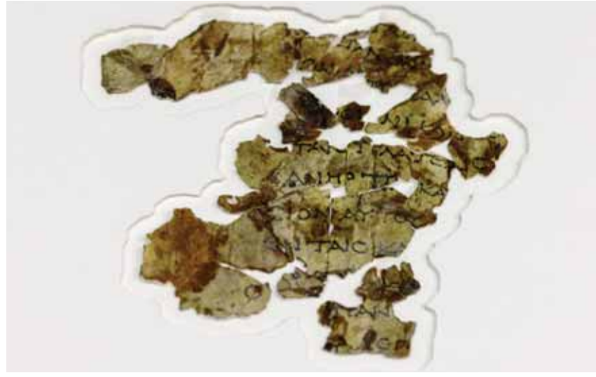
Recently-discovered 2000-year-old biblical scroll fragments from the Bar Kochba period, are displayed at the Israel Antiquities Authority's (IAA) Dead Sea conservation lab in Jerusalem.