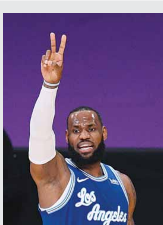
LOS ANGELES: LeBron James of the Los Angeles Lakers calls a play during the third quarter against the Minnesota Timberwolves at Staples Center on Tuesday in Los Angeles, California.