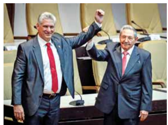
HAVANA: In this file photo taken on April 19, 2018 outgoing Cuban President Raul Castro (right) raises the arm of Cuba's new President Miguel Diaz-Canel after he was formally named by the National Assembly, in Havana.