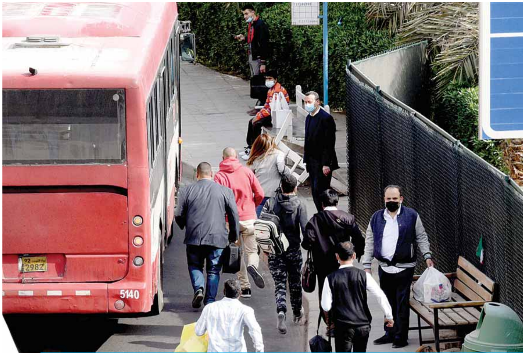
KUWAIT: People race to catch the bus at a bus stop in Kuwait City in this file photo. Finding public transportation remains a daily struggle for people who try to reach home in time before the curfew starts at 5:00 pm.