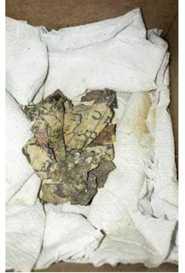
A handout picture shows a picture of scroll fragments found in the Cave of Horror in the Judean Desert.