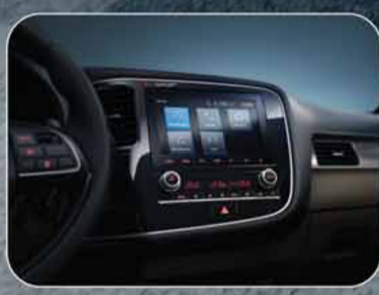
Smartphone Link Display Audio