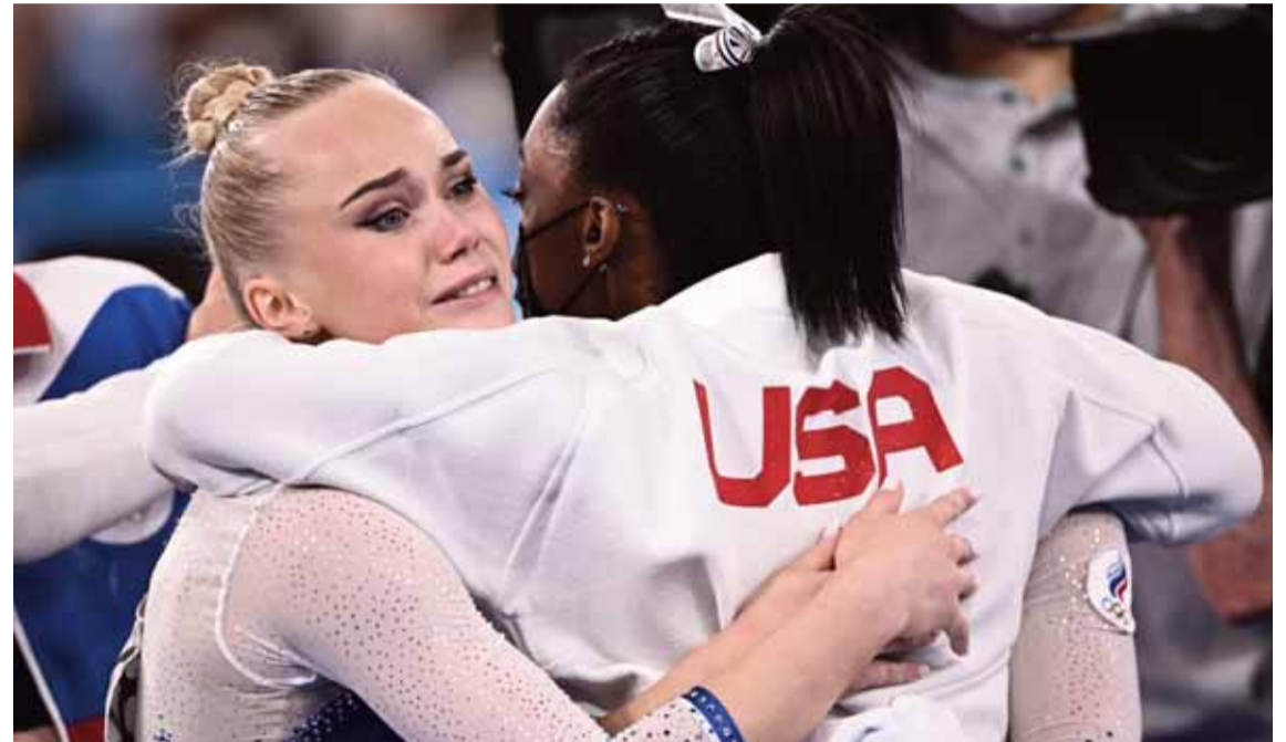
TOKYO: Russia's Angelina Melnikova (left) is congratulated by USA's Simone Biles as Russia wins the artistic gymnastics women's team final during the Tokyo 2020 Olympic Games at the Ariake Gymnastics Center in Tokyo yesterday.

Elsewhere, swimming powerhouses Australia and the United States won one gold medal each in the morning session and are on three golds apiece. Australian world-record holder Kaylee McKeown