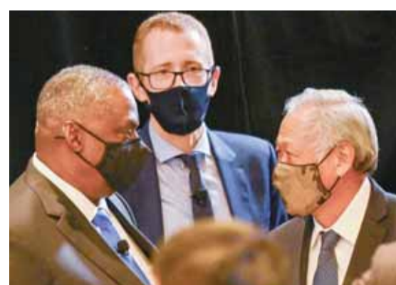
SINGAPORE: US Secretary of Defense Lloyd Austin (L) speaks with Singapore's Minister of Defence Ng Eng Heng during the 40th International Institute for Strategic Studies (IISS) Fullerton lecture in Singapore yesterday.

The US-China relationship has deteriorated over a range of issues from cybersecurity and tech supremacy to human rights in Hong Kong and Xinjiang. Biden has largely kept the hawkish stance on China of Donald Trump, describing the Asian power as the pre-eminent challenge to the United States, but has lowered the temperature and instead emphasised working with allies and working at home to compete better. After Singapore, Austin will visit Vietnam and the Philippines, and will seek to underline that the US is a "stabilising force" in