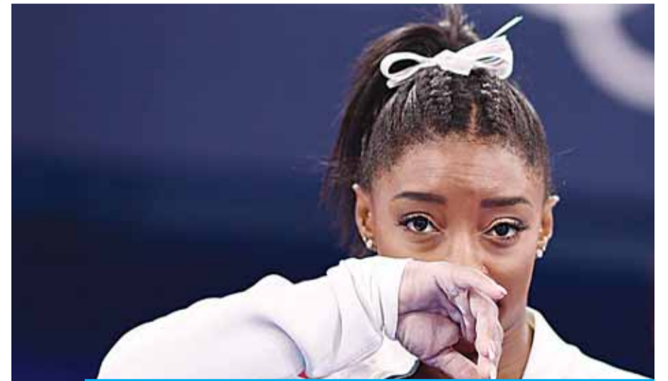
TOKYO: USA's Simone Biles gestures during the artistic gymnastics women's team final during the Tokyo 2020 Olympic Games at the Ariake Gymnastics Center in Tokyo yesterday.

With Biles watching on, the Americans approached the concluding floor exercise less than a point behind the Russians. But when Jordan Chiles failed to win the judges' approval with her performance it was all over. Russia,