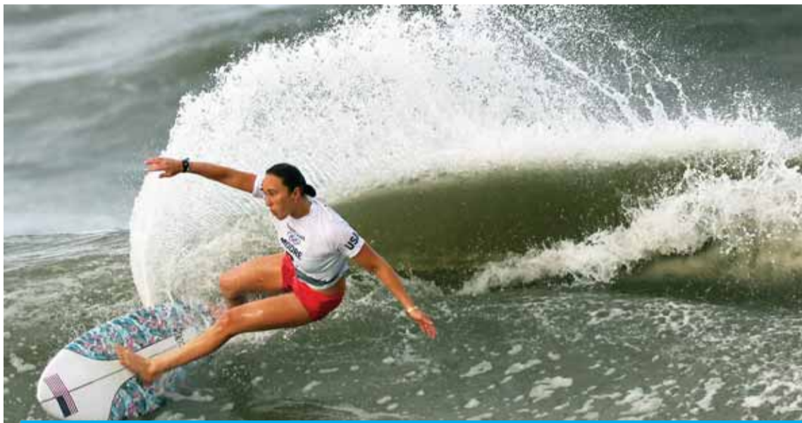
CHIBA: US's Carissa Moore competes during the women's Surfing gold medal final at the Tsurigasaki Surfing Beach, in Chiba, yesterday during the Tokyo 2020 Olympic Games.

Australia's Owen Wright took the bronze medal.