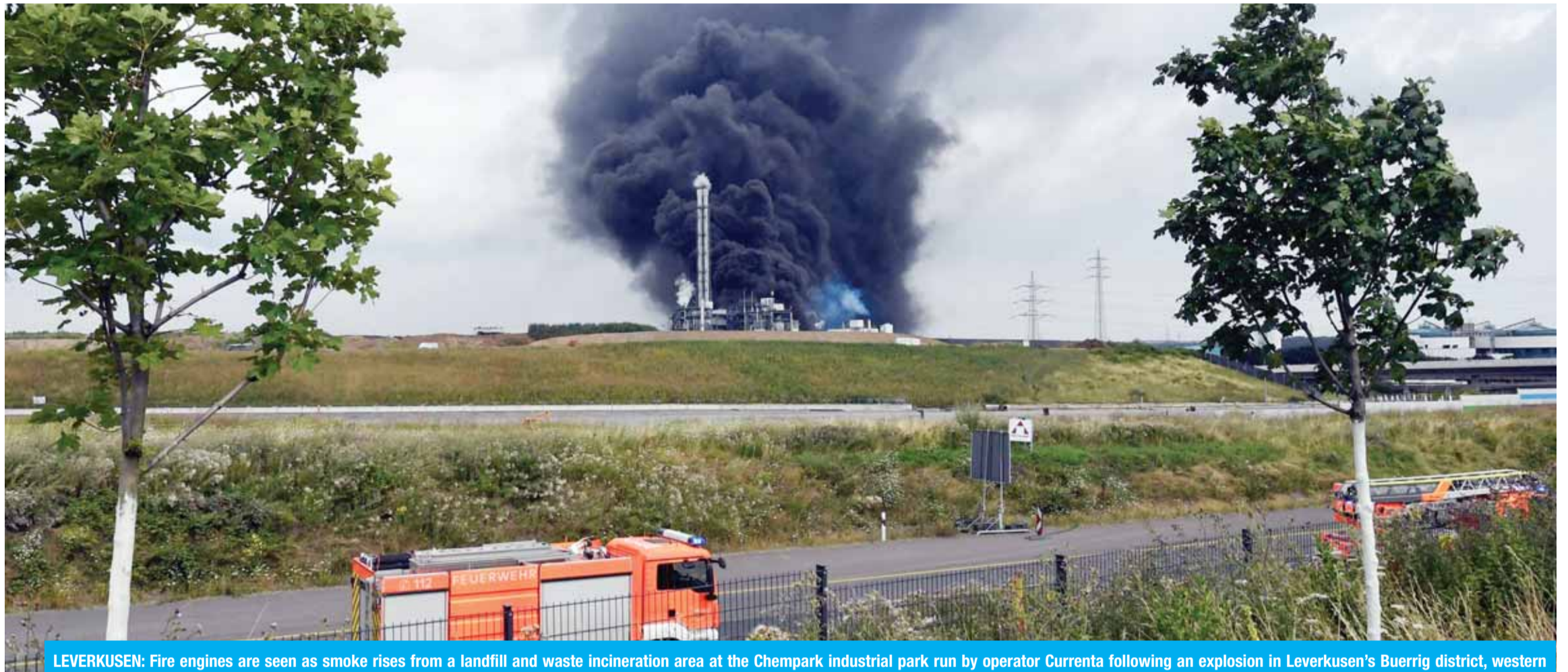
LEVERKUSEN: Fire engines are seen as smoke rises from a landfill and waste incineration area at the Chempark industrial park run by operator Currenta following an explosion in Leverkusen's Buerrig district, western Germany, yesterday.