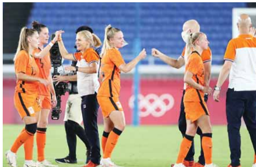
YOKOHAMA: Netherlands' coach Sarina Wiegman (third left) celebrates with players after Netherlands won the Tokyo 2020 Olympic Games women's group F first round football match between Netherlands and China at the Yokohama International Stadium in Yokohama yesterday.