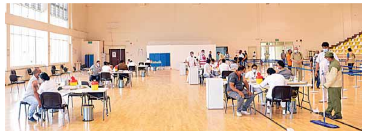
KUWAIT: People arrive at a vaccination center in Jleeb Al-Shuyoukh to take their COVID-19 vaccine shots yesterday.