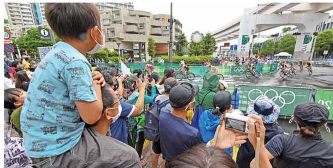
TOKYO: Fans watch as athletes compete in the women's individual triathlon competition during the Tokyo 2020 Olympic Games at the Odaiba Marine Park in Tokyo yesterday.