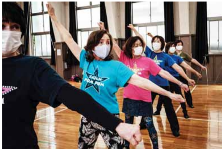
Members of the Japanese senior cheerleading squad "Japan Pom Pom".