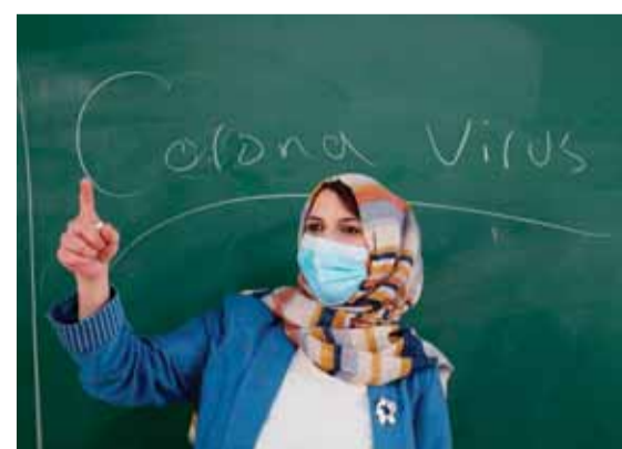
HEBRON: A Palestinian teacher addresses high school students as they return to class for the new academic year in this Aug 10, 2020 file photo.

While children in the northern hemisphere are on their summer holidays, in eastern and southern Africa, an estimated 40 percent of school-age children are currently out of school. Across that region,