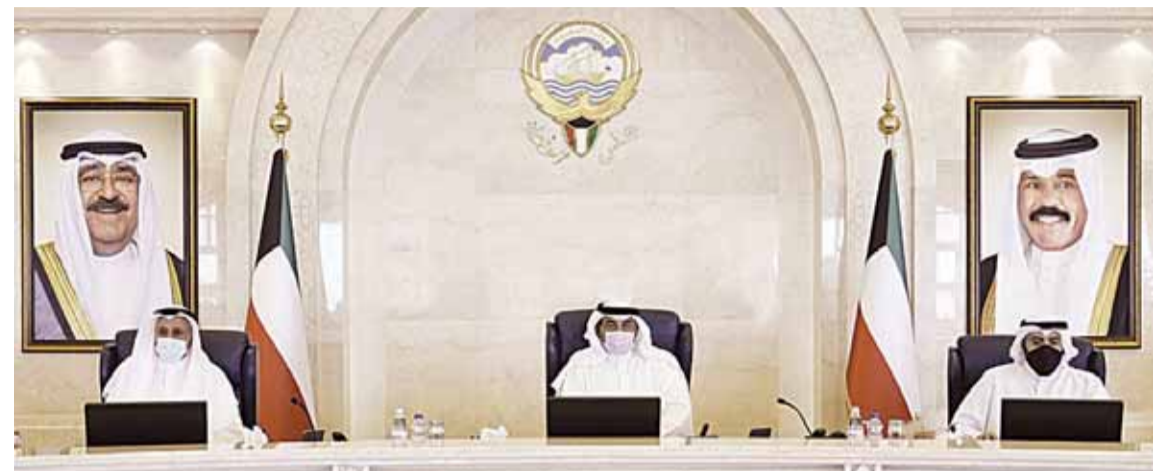
KUWAIT: His Highness the Prime Minister Sheikh Sabah Al-Khaled Al-Hamad Al-Sabah (center) chairs the Cabinet's meeting.

Moreover, the ministers extolled the bronze