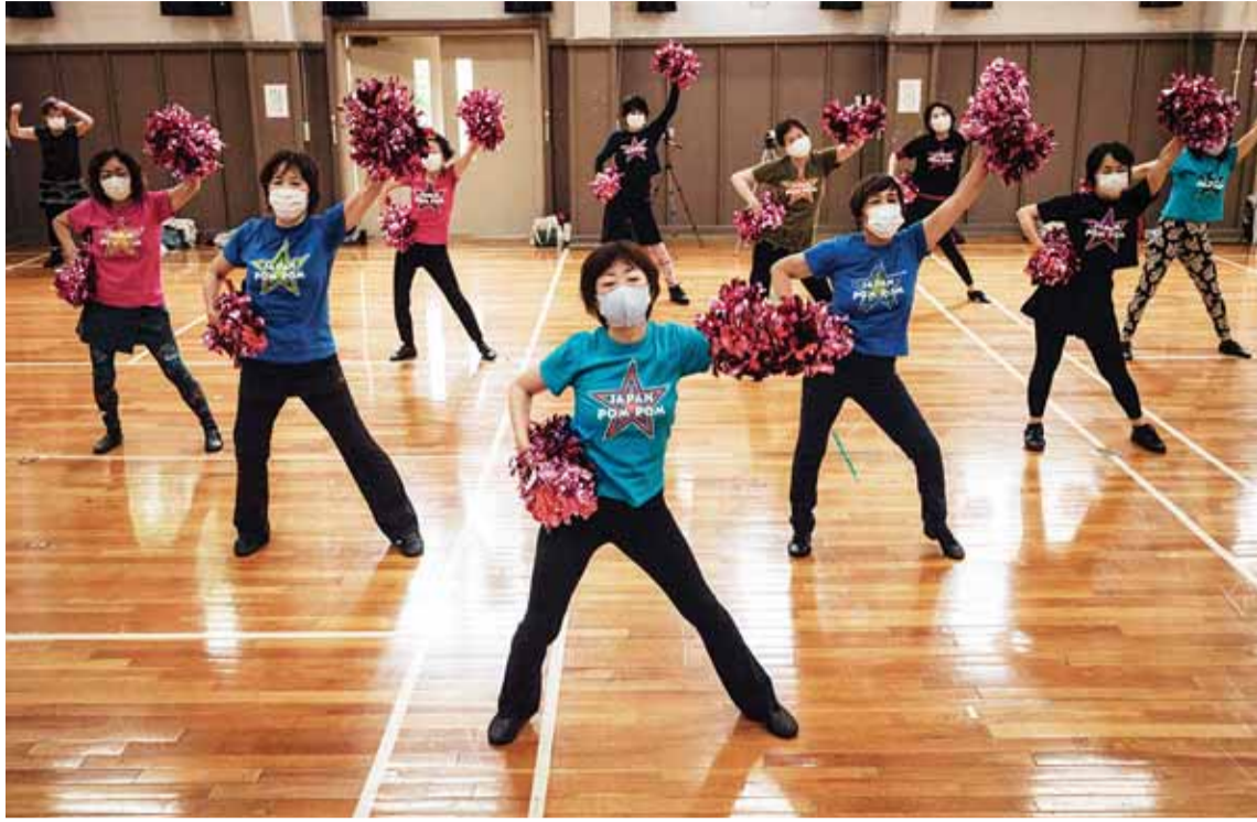
Members of the Japanese senior cheerleading squad 'Japan Pom Pom' take part in a practice in Tokyo as the city hosts the 2020 Tokyo Olympic Games.