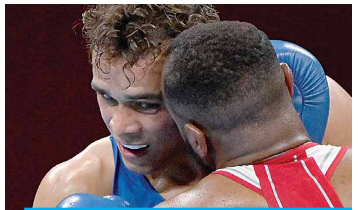
TOKYO: Morocco's Youness Baalla (red) and New Zealand's David Nyika fight during their men's heavy (81-91kg) preliminaries round of 16 boxing match during the Tokyo 2020 Olympic Games at the Kokugikan Arena in Tokyo yesterday. —AFP

Nyika, a two-time Commonwealth Games gold medalist who has already fought as a professional, said: "He didn't get a full mouthful. "Luckily he had his mouthguard in and I was a bit sweaty. "I was bitten on the chest at the Gold Coast Commonwealth Games (2018), but come on man, this is the Olympics." —AFP