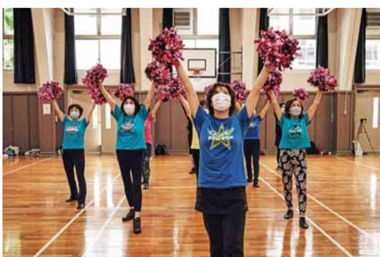
Members of the Japanese senior cheerleading squad "Japan Pom Pom".