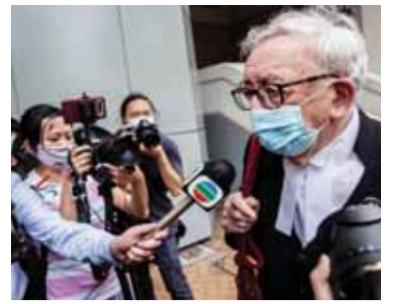
HK court convicts man in national security trial