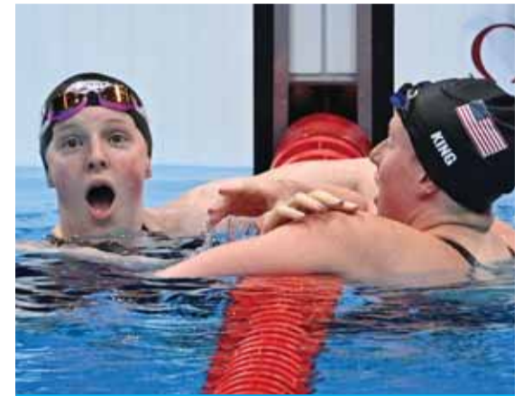
TOKYO: USA's Lydia Jacoby (left) celebrates winning with third-placed USA's Lilly King after the final of the women's 100m breaststroke swimming event during the Tokyo 2020 Olympic Games at the Tokyo Aquatics Centre in Tokyo yesterday.