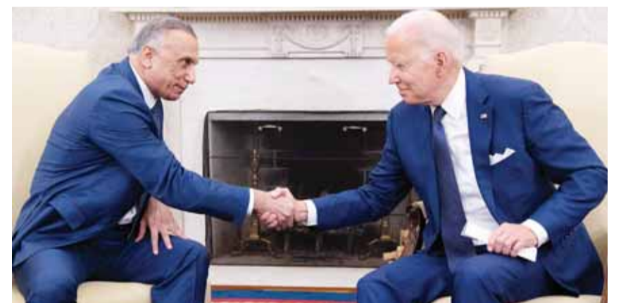
WASHINGTON: US President Joe Biden shakes hands with Iraqi Prime Minister Mustafa Al-Kadhemi in the Oval Office of the White House on Monday.