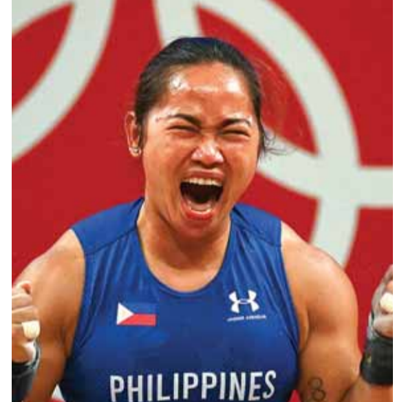
TOKYO: Philippines' Hidilyn Diaz reacts after placing first in the women's 55kg weightlifting competition during the Tokyo 2020 Olympic Games at the Tokyo International Forum in Tokyo on Monday.