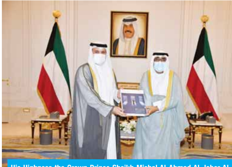
His Highness the Crown Prince Sheikh Mishal Al-Ahmad Al-Jaber Al-Sabah receives a copy of Kuwait Central Bank's annual report from Governor Dr Mohammad Al-Hashel.