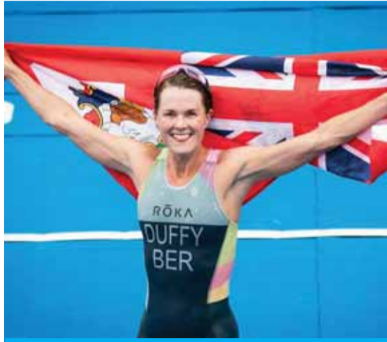
TOKYO: Bermuda's Flora Duffy celebrates after crossing the finish line to win the women's individual triathlon competition during the Tokyo 2020 Olympic Games at the Odaiba Marine Park in Tokyo yesterday.

In a race delayed by 15 minutes because of slippery conditions following heavy overnight rain in the Japanese capital, Duffy took control in the final running section. She had opened up a lead of almost a minute after the first of four laps and was never under