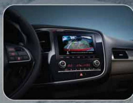
Rear View Camera