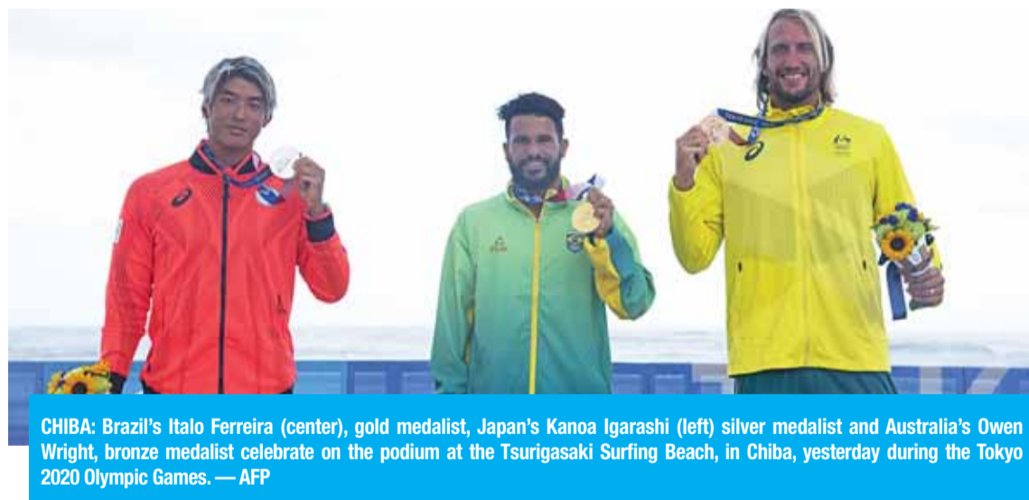
CHIBA: Brazil's Italo Ferreira (center), gold medalist, Japan's Kanoa Igarashi (left) silver medalist and Australia's Owen Wright, bronze medalist celebrate on the podium at the Tsurigasaki Surfing Beach, in Chiba, yesterday during the Tokyo 2020 Olympic Games.

ICHINOMIYA: Australian Owen Wright had to relearn how to surf and walk after suffering a horrific brain injury in 2015 — now he's an Olympic bronze medalist. Wright claimed a podium finish yesterday as surfing made its Olympic debut, beating Brazil's world number one Gabriel Medina in a tense play-off at Tsurigasaki Beach. But the 31-year-old had times when he couldn't even remember his name less than six years ago, after a huge wipeout in training left him with bleeding on the brain. "I didn't count myself out—that's the thing," an emotional Wright said after the medal ceremony. "I guess that's why I still imagined these big, lofty goals. Because I've come back from something that I wouldn't expect to come back from anyway. I don't mind aiming for the top."