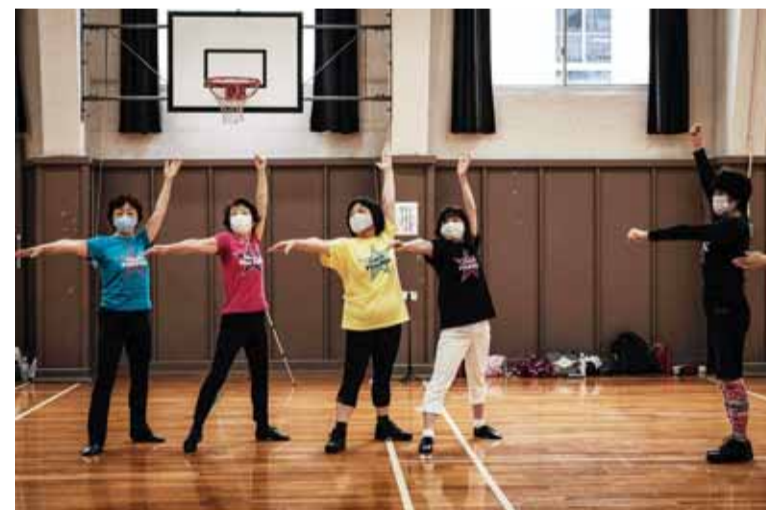
Members of the Japanese senior cheerleading squad "Japan Pom Pom".