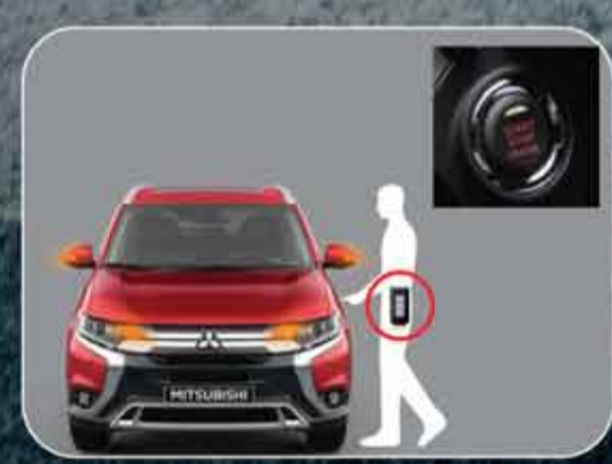
Keyless Operation System