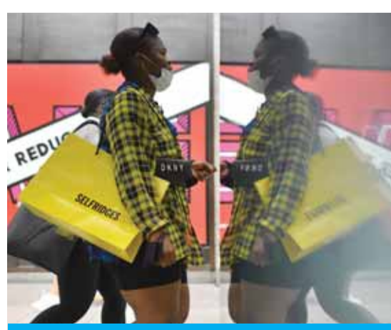
LONDON: Shoppers carry Selfridges bags as they walk past Selfridges flagship store on Oxford street in central London.

John Lewis Partnership meanwhile announced plans to slash 1,000 management jobs this month, having already axed 16 stores during the pandemic with the loss of 2,800 positions. High street retailers were already struggling before the COVID outbreak due to intense competition from supermarkets and online giants like Amazon. — AFP