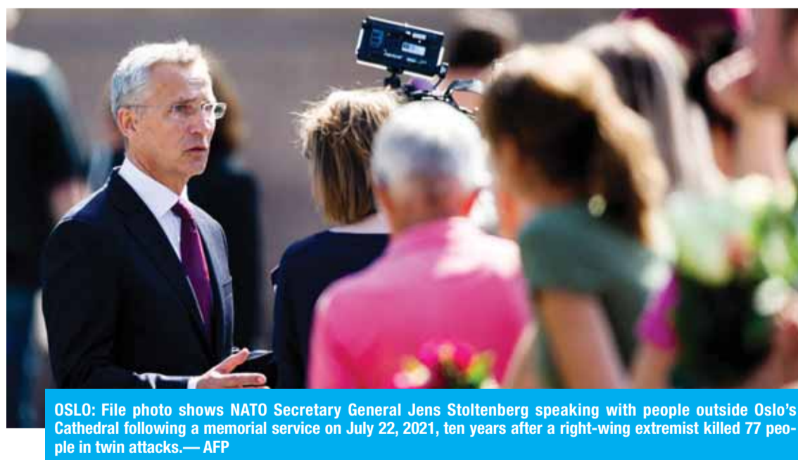
OSLO: File photo shows NATO Secretary General Jens Stoltenberg speaking with people outside Oslo's Cathedral following a memorial service on July 22, 2021, ten years after a right-wing extremist killed 77 people in twin attacks. — AFP

Myanmar's economy is expected to shrink by 18 percent in 2021, the World Bank said Monday, as a result of massive unrest following the coup and a third coronavirus wave. The NLD saw their support increase in the 2020 vote compared to the previous election in 2015. — AFP