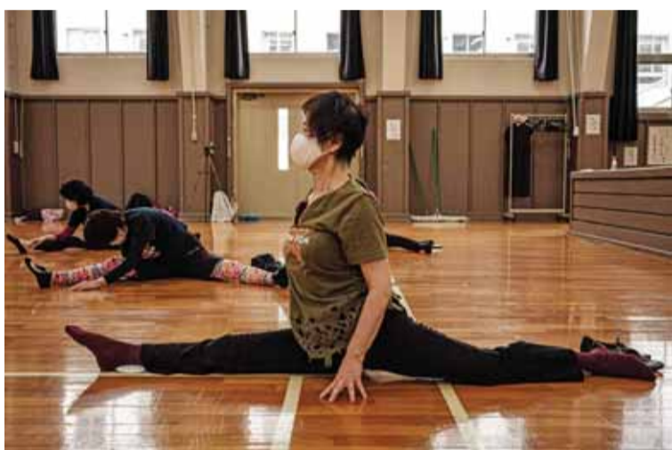
Members of the Japanese senior cheerleading squad "Japan Pom Pom" stretch before taking part in a practice in Tokyo.