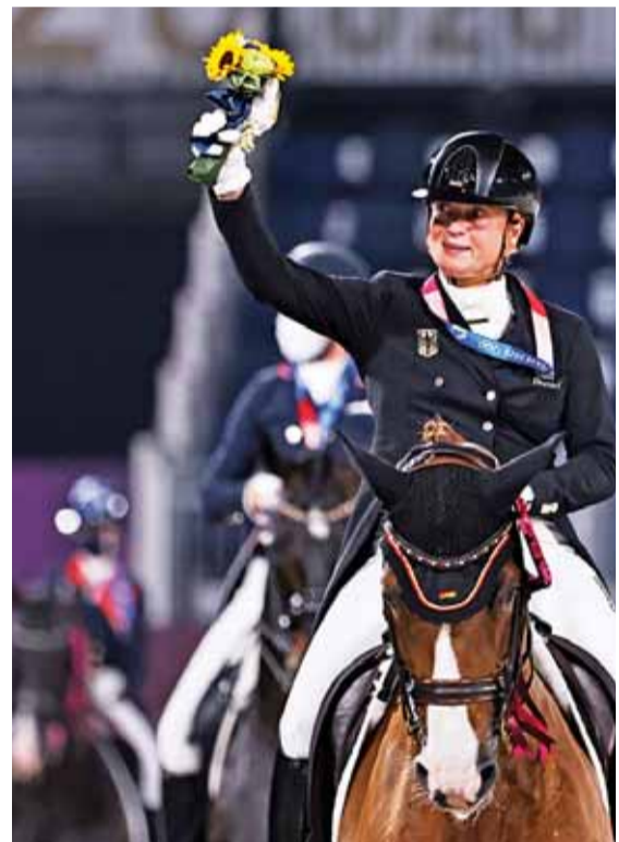
TOKYO: Gold medalist Isabell Werth of Germany rides on her horse together with other medalists after the medal ceremony of dressage grand prix special team competition during the Tokyo 2020 Olympic Games at the Equestrian Park in Tokyo yesterday.