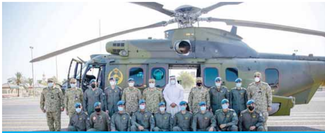
KUWAIT: National Guard Deputy Chief Lt Gen Sheikh Ahmad Nawaf Al-Sabah attends the inauguration ceremony of the Caracal multirole helicopters. — KUNA

KUWAIT: Kuwait yesterday said Caracal multirole helicopters should reinforce capabilities across state bodies, as the first batch of the French-made aircraft landed in the country under a military deal worth $1 billion. The multirole aircraft will facilitate integral operations such as search and rescue efforts, in addition to emergency evacuation plans, said Kuwait National Guard Deputy Chief Lt Gen Sheikh Ahmad Nawaf Al-Sabah.