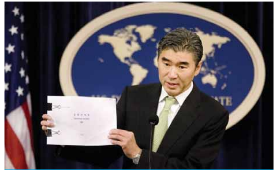
Sung Kim, the top US diplomat in charge of North Korea negotiations.