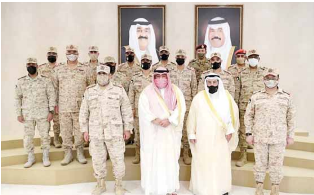
KUWAIT: Interior Minister and acting Defense Minister Sheikh Thamer Ali Al-Sabah meets top officers of the army.

KUWAIT: Interior Minister and acting Defense Minister Sheikh Thamer Ali Al-Sabah expressed yesterday his pride on the efforts and sacrifices of the Kuwaiti armed forces towards their country. During the reception of the ministry's workers and staff on the occasion of Eid Al-Adha, Sheikh Thamer praised the cooperation and coordination