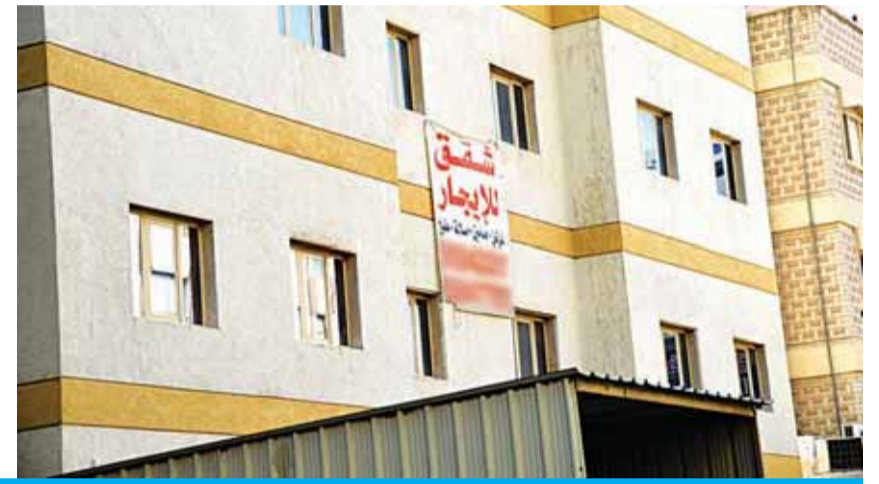
KUWAIT: Several pictures showing signs outside residential buildings in Kuwait saying that apartments are available for rent. 'For Rent' signs have noticeably increased in Kuwait as building owners race to fill vacant apartments, even offering reduced rents in some areas.