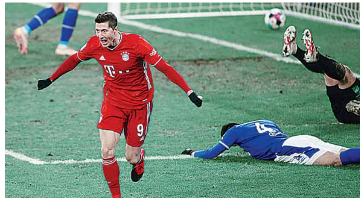
GELSENKIRCHEN: Bayern Munich's Polish forward Robert Lewandowski celebrates scoring the 0-2 goal during the German first division Bundesliga football match Schalke 04 v FC Bayern Munich in Gelsenkirchen, western Germany, on Sunday.

However, Bayern coach Hansi Flick saw room for improvement. "I wasn't completely satisfied. Sure,