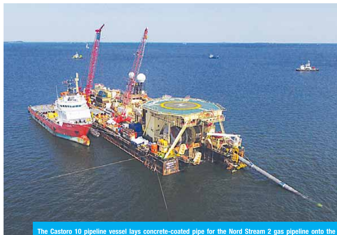
The Castoro 10 pipeline vessel lays concrete-coated pipe for the Nord Stream 2 gas pipeline onto the seabed of the Baltic Sea on near Lubmin, Germany.

The European Parliament on Friday passed a non-binding resolution urging Brussels to block to completion of the 1,200 kilometer-long pipeline. Work on the massive project resumed