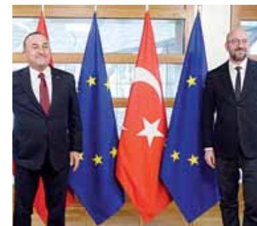
Greece, Turkey bow to EU pressure, open first direct talks since 2016