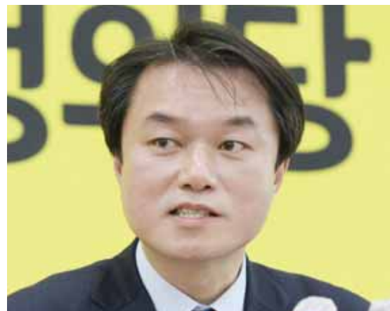
SEOUL: This picture shows Kim Jong-Cheol, chairman of South Korea's left-wing Justice Party, speaking during a press conference at the National Assembly in Seoul.

"I decided to make this public and hold him accountable because I believed doing so would restore my dignity and pave a path for me to return to normal life," she said, in comments lauded on social media. Kim admitted he "made physical contacts that the victim neither wanted nor consented to and committed clear sexual harassment". "This was an act that could not be excused and caused great harm to her," he said in a statement, offering