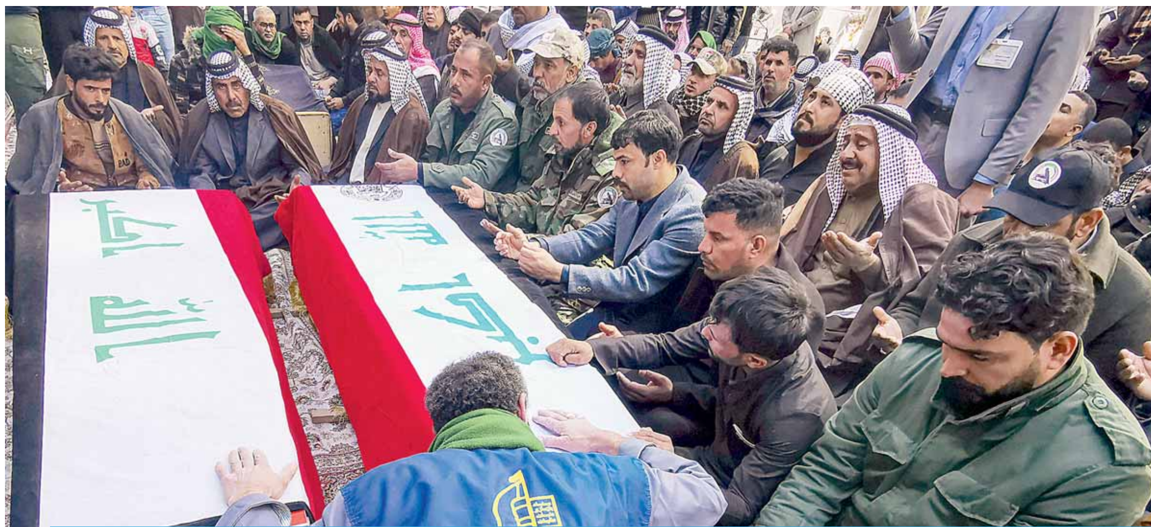
NAJAF: Supporters and members of Iraq's Hashed al-Shaabi force react by coffins of members of the powerful pro-Iran paramilitary network during a funeral ceremony in the holy city of Najaf on Sunday, a day after they were killed in an ambush north of the capital.