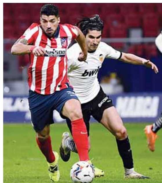
MADRID: Atletico Madrid's Uruguayan forward Luis Suarez (left) vies with Valencia's Spanish midfielder Carlos Soler during the Spanish league football match between Club Atletico de Madrid and Valencia CF at the Wanda Metropolitano stadium in Madrid on Sunday.

Messi is still serving his punishment for being sent off in Seville but the Argentinian will be available again for Wednesday's cup tie at Rayo