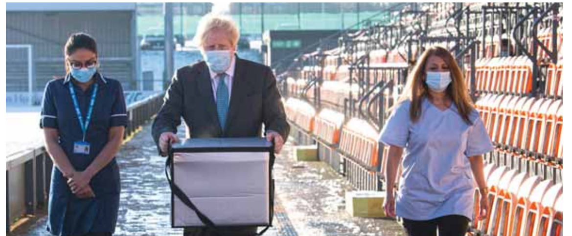
LONDON: Prime Minister Boris Johnson carries Oxford/AstraZeneca COVID-19 vaccines for distribution during a visit to Barnet FC's ground at The Hive, north London, which is being used as a coronavirus vaccination center yesterday. — AFP

It comes as border rules were being tightened around the world. The United States yesterday set to reimpose a ban on most non-US citizens who have been in Britain, Brazil, Ireland and much of Europe from visiting, as well as adding South Africa to the list. — AFP