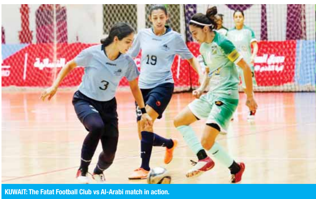
KUWAIT: The Fatat Football Club vs Al-Arabi match in action.

KUWAIT: Fatat Football Club defeated Al-Arabi 7-2 in the conclusion of the second part of the Women's Indoor Football League (URC). With this win, the Fatat Club increased its point total to 23 on top of the standings, while Al-Arabi remained third with 13 points. Meanwhile, Kuwait defeated Salwa Al-Sabah Club 9-1, placing it in second place on goal difference. Salwa remains in fifth place with 3 points. Fatat, Arabi, Kuwait and Qadisiya qualified for the semifinals. The semifinals will start on Saturday in the playoffs format, and the winner of the best of three matches will qualify to the final. Fatat will play Qadisiya while Arabi will meet Kuwait in the playoffs.