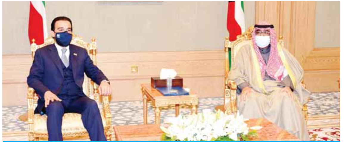
His Highness the Crown Prince Sheikh Mishal Al-Ahmad Al-Jaber Al-Sabah meets Iraqi parliament speaker Mohammad Al-Halbousi.

KUWAIT: His Highness the Amir Sheikh Nawaf Al-Ahmad Al-Jaber Al-Sabah received yesterday at Seif Palace National Assembly Speaker Marzouq Al-Ghanem, accompanied by Iraqi parliament speaker Mohammad Al-Halbousi and his accompanying delegation. His Highness the Crown Prince Sheikh Mishal Al-Ahmad Al-Jaber Al-Sabah and His Highness the Prime Minister Sheikh Sabah Al-Khaled Al-Hamad Al-Sabah received the visiting Iraqi parliament speaker separately at Seif Palace. Minister of Defense Sheikh Hamad Jaber Al-Ali Al-Sabah attended the meeting between His Highness the Prime Minister and the Iraqi speaker.