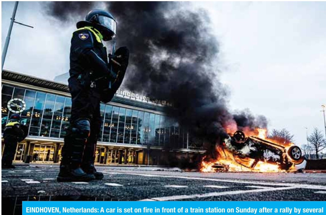
EINDHOVEN, Netherlands: A car is set on fire in front of a train station on Sunday after a rally by several hundreds of people against the government's coronavirus policy.

Moderna vaccine 'protective' against variants • COVID riots in Netherlands