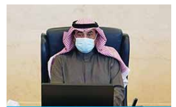
KUWAIT: HH the Prime Minister Sheikh Sabah Al-Khaleed Al-Hamad Al-Sabah chairs the Cabinet's weekly meeting yesterday.

But the ILO cautioned that the prospects for a global labor market recovery this year are "slow, uneven and uncertain." The organization pointed to the uneven impact the crisis had had on the world's workers, affecting women and younger workers far more than others. Globally, employment losses for women last year stood at five percent, compared with 3.9 percent for men. Women are more likely to work in the harder-hit sectors of the economy, and also have taken on more of the burden of, for instance, caring for children forced to stay home from school. — AFP