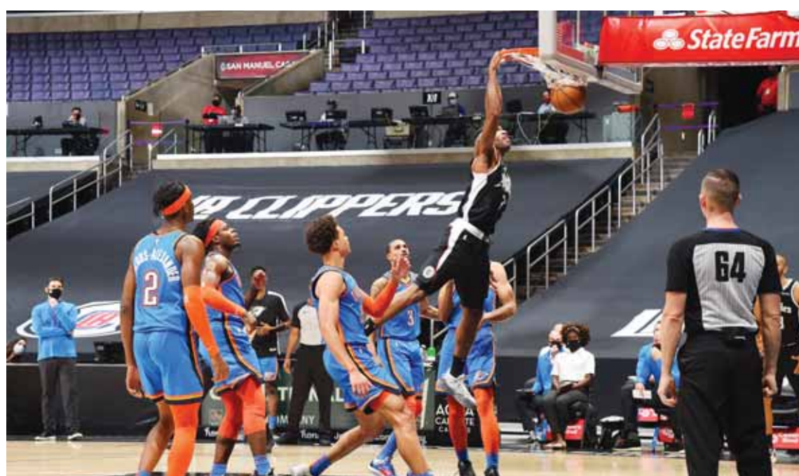
LOS ANGELES: Kawhi Leonard #2 of the LA Clippers dunks the ball during the game against the Oklahoma City Thunder on Sunday at STAPLES Center in Los Angeles, California.

The Spurs led by as many as 11 points in the fourth quarter and then used a 15-1 run down the stretch to cruise to victory. Wizards top scorer Bradley Beal had 31 points and Jerome Robinson added 16, while Alex Len finished with 11 points.