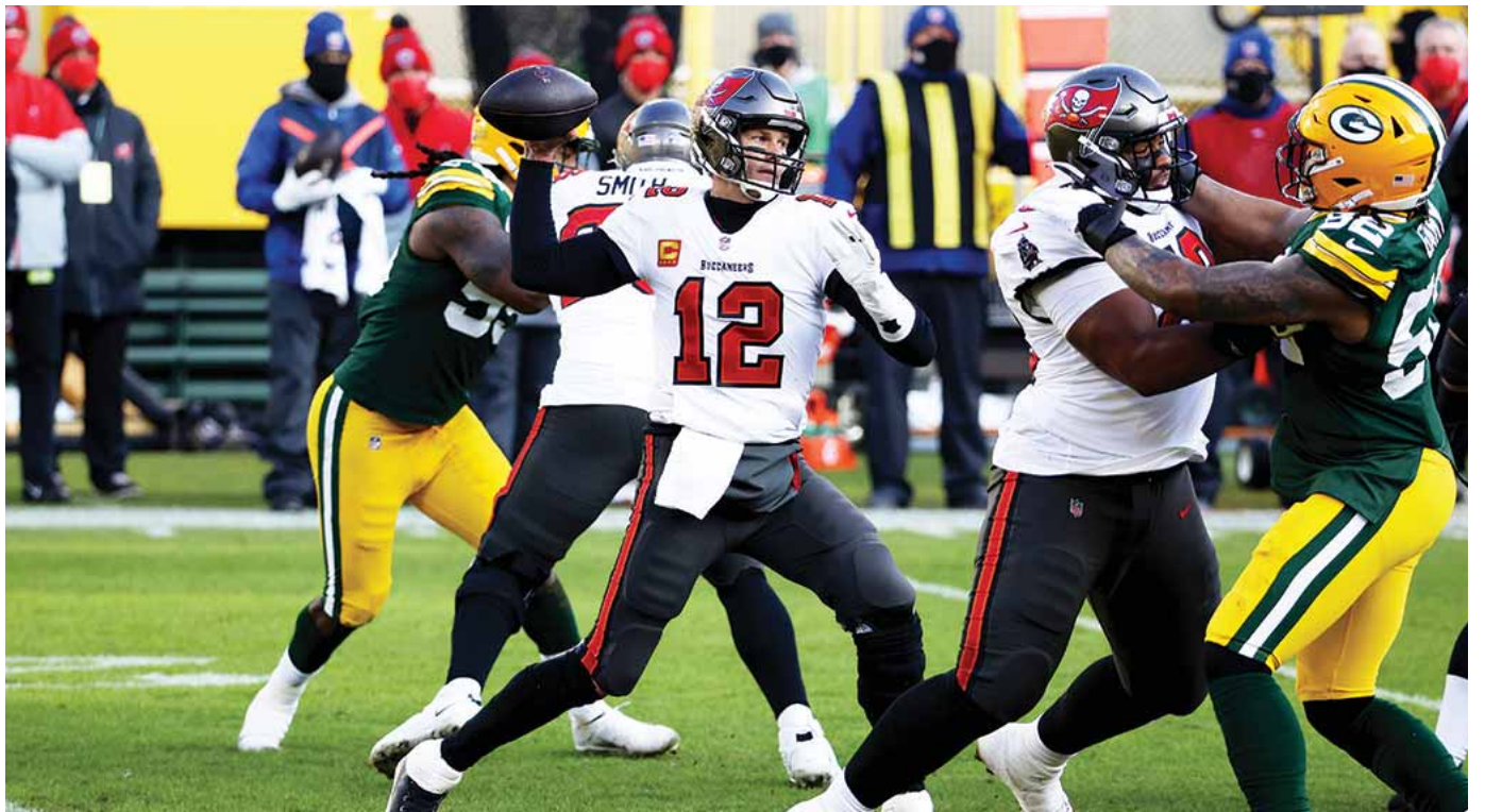
GREEN BAY: Tom Brady #12 of the Tampa Bay Buccaneers looks to pass in the second quarter against the Green Bay Packers during the NFC Championship game at Lambeau Field on Sunday in Green Bay, Wisconsin.

"It was just trusting each other," Chiefs quarterback Mahomes said. "The thing about this team is that we trust each other, and every time we go on the field we give it everything we have. But the job's not finished — we're going to Tampa and we're going to try and run it back. We've just got to go to Tampa and be ourselves. I trust my guys over anybody."