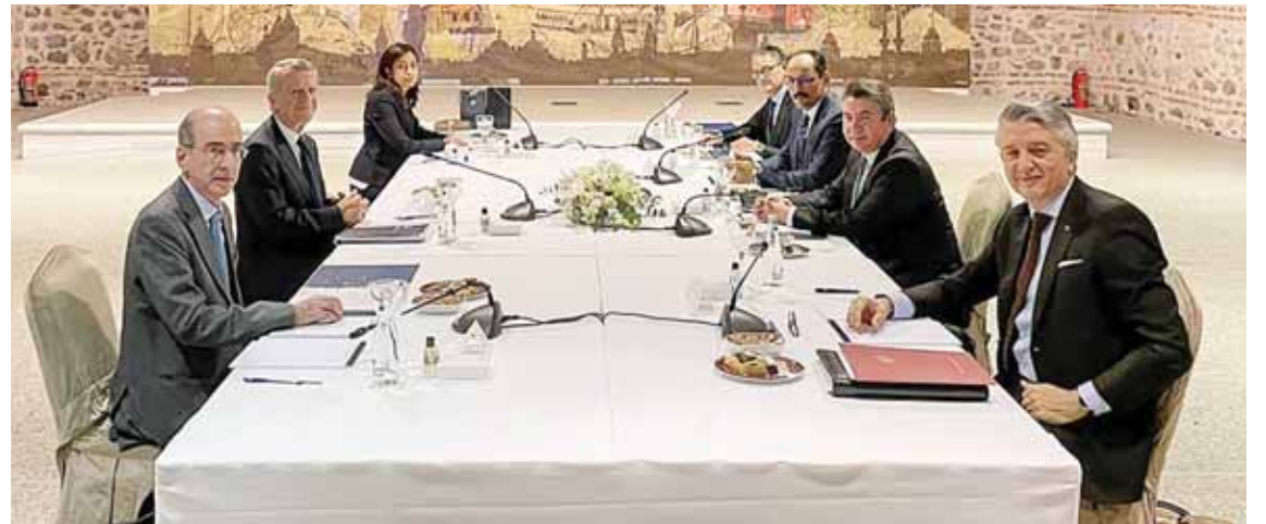
ISTANBUL: Greek diplomat Pavlos Apostolidis, Turkish Deputy Foreign Minister Sedat Onal, Turkish President's spokesman Ibrahim Kalin and their delegation meeting at Dolmabahce Palace as talks resumed over their Eastern Mediterranean dispute.

The process could be helped along if it involved a third party such as the US or Germany, according to security and energy expert Michael Tanchum. "The likely outcome of such adjudication would invalidate the use of some small Greek islands near Turkey's mainland... while upholding the use of