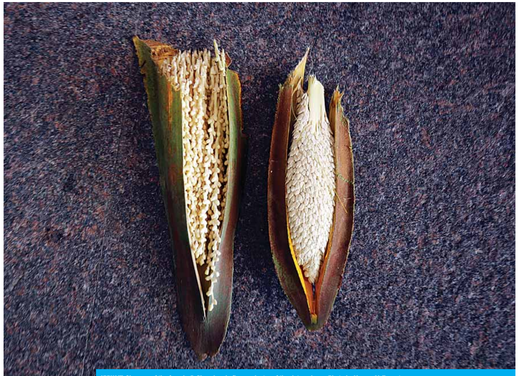
KUWAIT: Close up of the female (left) and male flower cluster of the date palm.