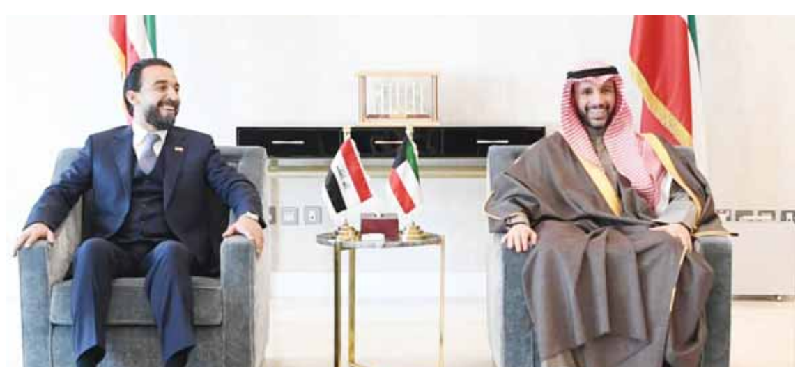
Kuwait's National Assembly Speaker Marzouq Al-Ghanem meets Iraqi parliament speaker Mohammad Al-Halbousi.