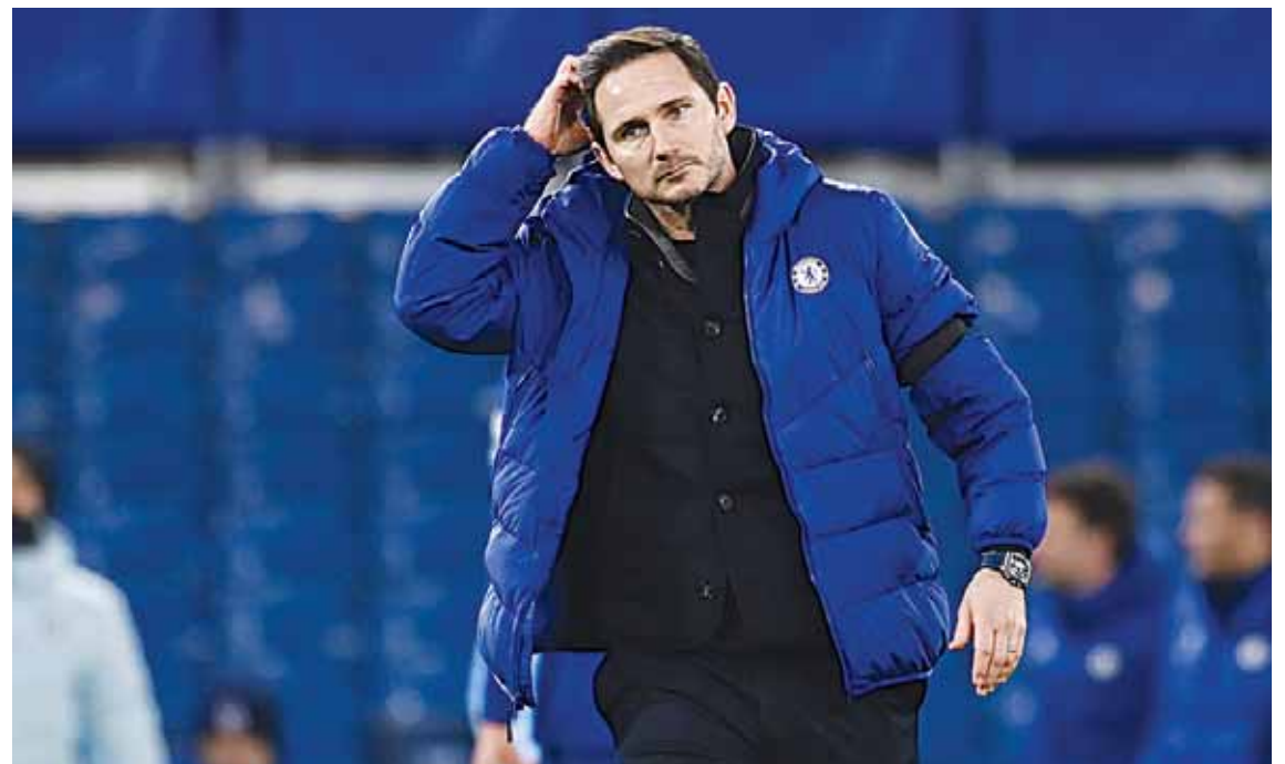
LONDON: In this file photo taken on January 03, 2021 Chelsea's English head coach Frank Lampard reacts to their defeat on the pitch after the English Premier League football match between Chelsea and Manchester City at Stamford Bridge in London.

His first managerial posting was at Championship club Derby. In his one season in charge, they reached the Championship play-off final, where they lost to Aston Villa. Lampard then became the 10th full-time manager appointed by Abramovich since the billionaire bought the club in 2003. "He is