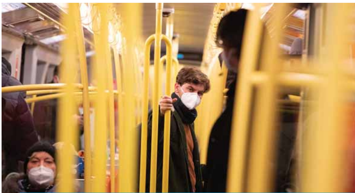
VIENNA: A commuter wears an FFP2 protective facemask on a public transport underground train in Vienna yesterday, during the ongoing novel coronavirus (Covid-19) pandemic. — AFP

The new president last week tightened mask wearing rules and ordered quarantine for people flying into the United States, as he seeks to tackle the country's worsening coronavirus crisis. Biden has said that the COVID-19 death toll would likely rise from 420,000 to half a million next month—and that drastic action was needed. "We're in a national emergency. It's time we treated it like one," he said on Thursday. In his last days in office, Donald Trump announced that a COVID-19 ban on travelers arriving from much of Europe and Brazil would be lifted—but the Biden administration immediately said it would reverse the order due to come into effect on January 26. — AFP