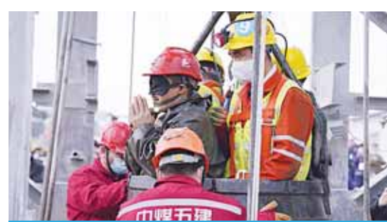
QIXIA, China: One of twenty-two Chinese miners wearing a black patch is saved from hundreds of meters underground, in Qixia, in eastern China's Shandong province.

Rescue operations sped up dramatically on Sunday as a blockage in the ventilator shaft was cleared. Onsite workers had previously estimated that it would