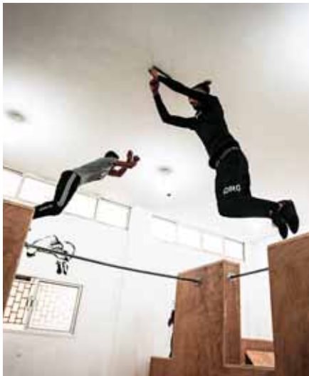
Palestinian youths train at the Wallrunners Parkour Academy's training facility.

32, opened what he says is the "first parkour academy in the Palestinian territories", with the support of French sporting goods giant Decathlon. "I started doing parkour in 2005," he said at his club in Al-Shati refugee camp, near Gaza City. "At the time, we didn't have a dedicated space, we trained in ceme-