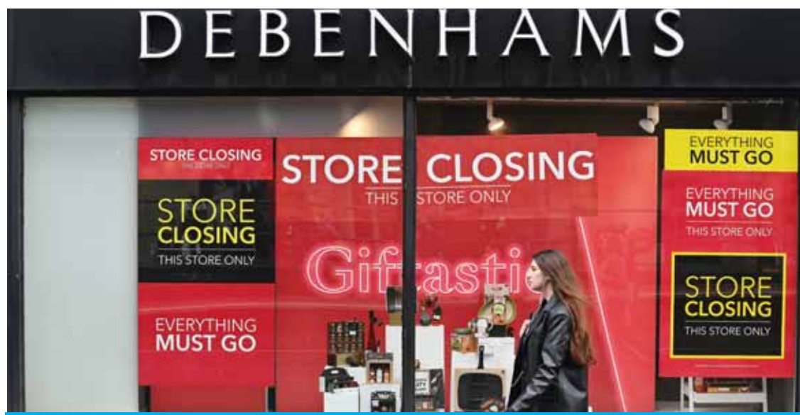
MANCHESTER: In this file photo, a pedestrian walks past "Store Closing" signs in the window display of a Debenhams store in Manchester, northern England. UK department store chain Debenhams is to shut all its outlets with the loss of around 12,000 jobs.

"However, the current lockdown situation has forced us to cut the final ties between our favorite brands and the physical high street," Fletcher added. Debenhams' stores will reopen following the lifting of the UK lockdown solely to liquidate stock,