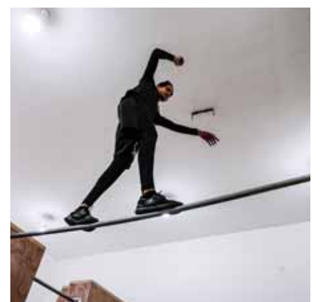
A Palestinian youth trains at the Wallrunners Parkour Academy's training facility.