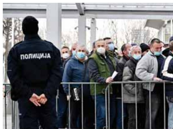
BELGRADE: People queue to receive the Chinese-made Sinopharm COVID-19 vaccine outside the Belgrade Fairground turned into a vaccination center yesterday.

Adding up the deficits of the current and next fiscal years takes the total deficit to KD 26.1 billion. Budget deficits are covered by the state reserve fund, which is separate from the fund for future generations, whose assets are estimated at around $600 billion. Former finance minister Barrak Al-Sheetan had repeatedly warned that the state reserve fund will soon run out of cash because of huge spending and low income.