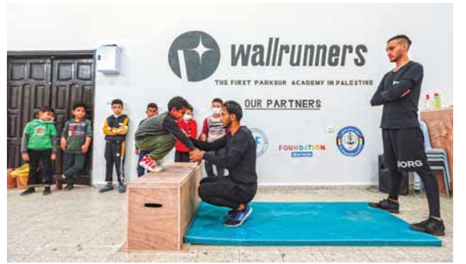
A coach trains Palestinian children at the Wallrunners Parkour Academy's training facility.

It teaches the sport "in a safe way, far from the dangers of the street," he told AFP. It has a modest budget but already has some 70 members, includ-