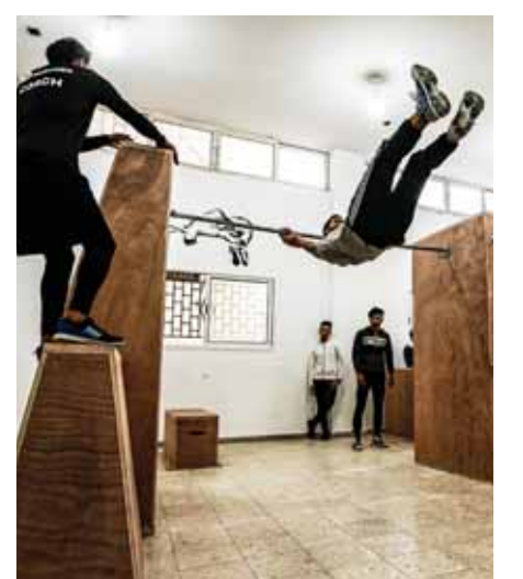
Palestinian youths train at the Wallrunners Parkour Academy's training facility in Gaza City.