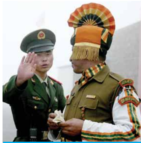
In this file photo a Chinese soldier gestures as he stands near an Indian soldier on the Chinese side of the ancient Nathu La border crossing between India and China. — AFP

Details of the latest clash emerged on the eve of India's Republic Day, when the country shows off its latest military hardware at a parade in the capital. Hand-to-hand fighting between 150 soldiers at Naku La in May also set off tensions. About 10 troops from each side were injured. The use of firearms by border patrols is banned under a bilateral agreement. In June, troops fought with fists and wooden clubs in the Galwan valley of Ladakh region, leaving dozens dead. China has never confirmed it suffered fatalities. —AFP