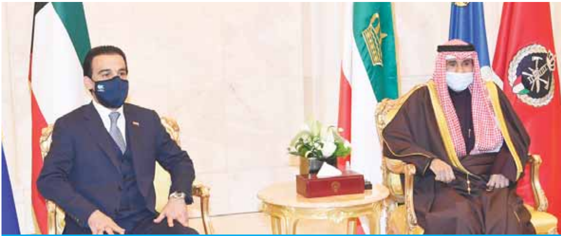
KUWAIT: His Highness the Amir Sheikh Nawaf Al-Ahmad Al-Jaber Al-Sabah meets Iraqi parliament speaker Mohammad Al-Halbousi.