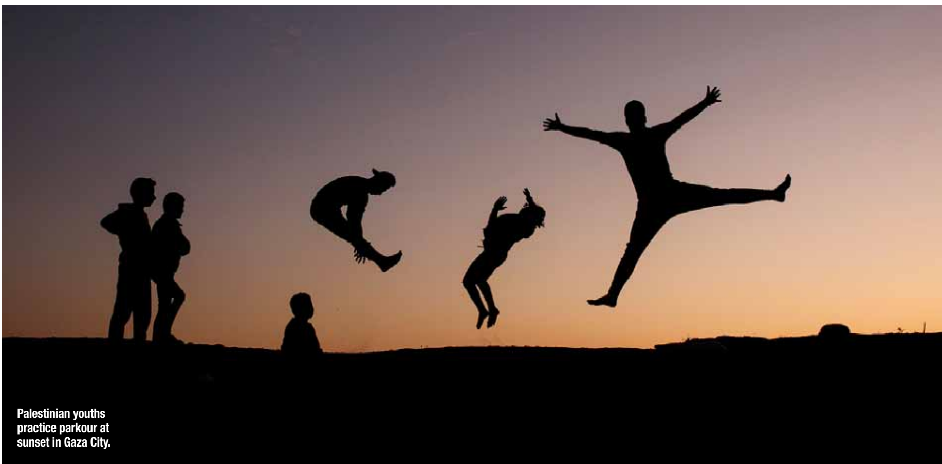
Palestinian youths practice parkour at sunset in Gaza City.