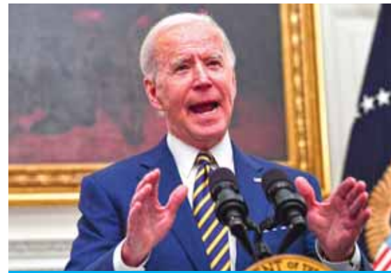
WASHINGTON: In this file photo US President Joe Biden speaks about the COVID-19 response before signing executive orders for economic relief to COVID-hit families and businesses in the State Dining Room of the White House in Washington.

During his presidential campaign, Biden promised to strengthen the "Buy American" process with a $400 billion plan for projects using US-made products—including steel, or protective equipment for healthcare