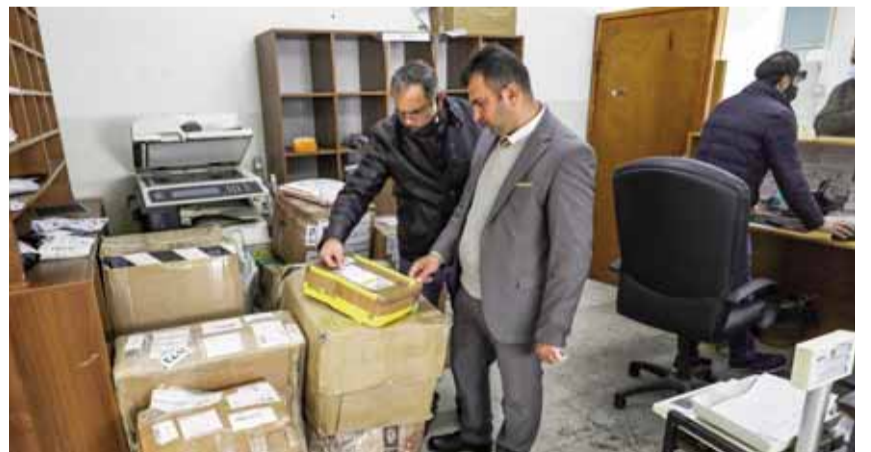
AL-BIREH: Palestinian postal workers examine a mail package at a post office in this city about 15 km north of Jerusalem in the occupied West Bank on Sunday.