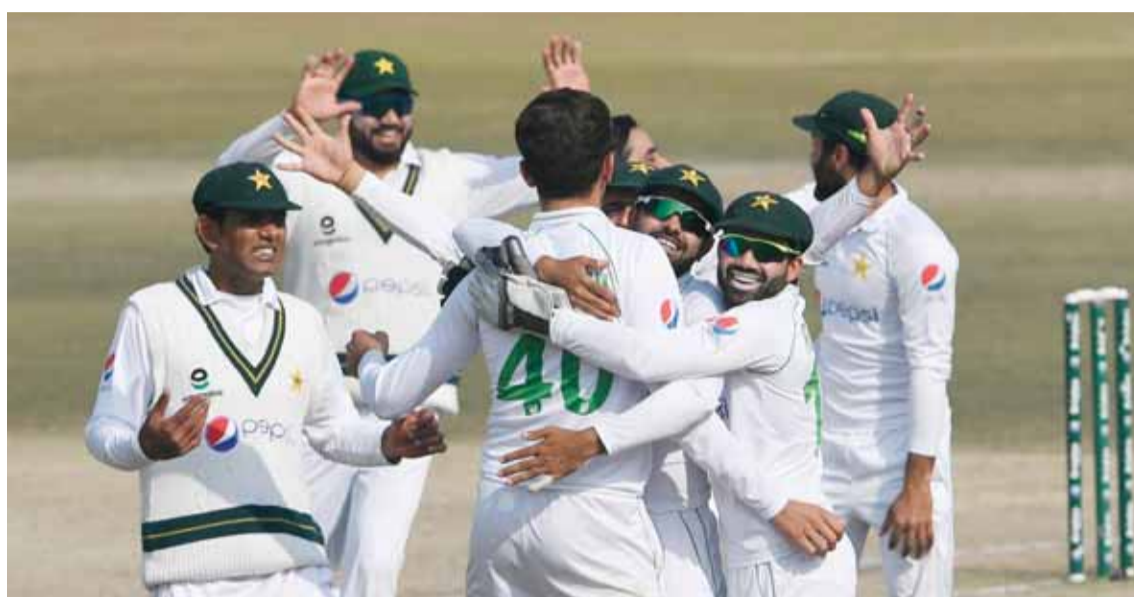
RAWALPINDI: Pakistan's players celebrate after the dismissal of South Africa's Keshav Maharaj during the fifth and final day of the second Test cricket match between Pakistan and South Africa at the Rawalpindi Cricket Stadium in Rawalpindi yesterday.

This is Pakistan's only second Test series win over South Africa in 12 attempts, having lost eight