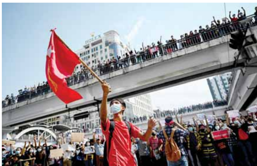
YANGON: Protesters gather to demonstrate against the February 1 military coup, in downtown in Yangon yesterday.

Tens of thousands of people rallied over the weekend in the first major outpourings of opposition, and the movement built on Monday with bigger protests in key locations across the