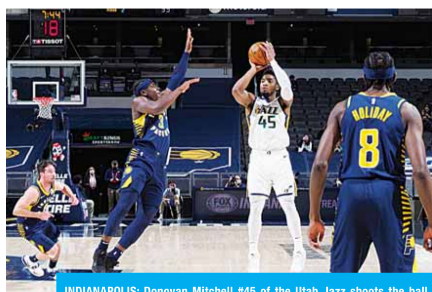
INDIANAPOLIS: Donovan Mitchell #45 of the Utah Jazz shoots the ball against the Indiana Pacers on Sunday at Bankers Life Fieldhouse in Indianapolis, Indiana.

Multiple media reports Sunday said the Detroit Pistons traded veteran guard Derrick Rose — second in scoring among NBA reserves — to the Knicks, where he will reunite with coach Tom Thibodeau after the two