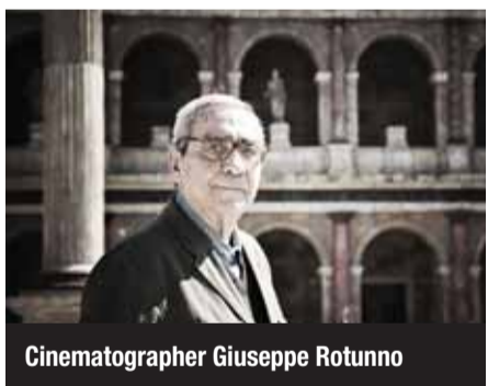
Cinematographer Giuseppe Rotunno

Rotunno went on to work with Italy's greatest directors including Fellini, for whom he was director of photography for eight films including "Casanova" (1976) and "Satyricon" (1969). Abroad, he worked with Pollack in "Sabrina" as well as John Huston ("The Bible") and Terry Gilliam ("The Adventures of Baron Munchausen"). He was nominated for an Oscar and won a Bafta Award in 1980 for "All That Jazz".