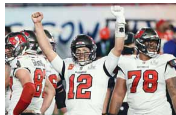
TAMPA: Tom Brady #12 of the Tampa Bay Buccaneers celebrates winning Super Bowl LV at Raymond James Stadium on Sunday in Tampa, Florida.

This time Brady arched a bullet pass through a crowd of defenders to find Brown for a touchdown and a 21-6 lead. After a Butker field goal made it 21-9, Fournette plunged the dagger with a 27-yard gallop for a touchdown in the third quarter. Another Buccaneers field goal from Succop made it 31-9 heading into the fourth quarter, and the game ended as the Bucs grabbed another interception.