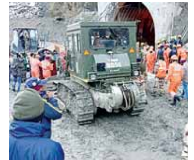
18 dead and 200 still missing after Indian glacier disaster