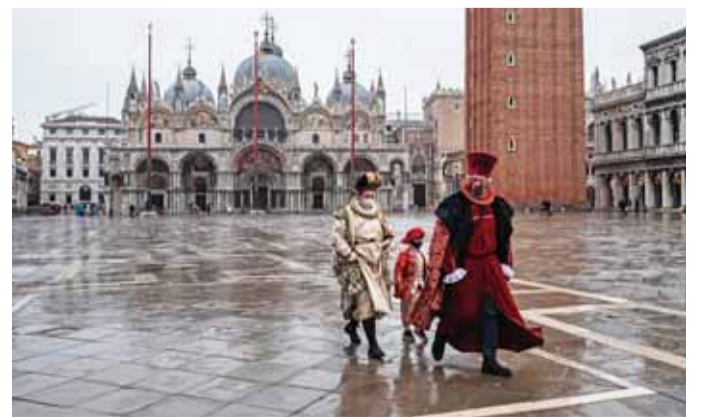
Venetian artisans wearing a carnival mask and costume are pictured prior to take part in a demonstration of The Confederation of Venice Artisans (Confartigianato Venezia).