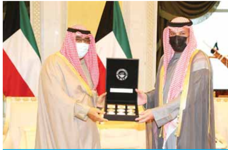
His Highness the Crown Prince Sheikh Mishal Al-Ahmad Al-Jaber Al-Sabah receives the commemorative coins from Governor of the Central Bank of Kuwait Dr Mohammad Yousef Al-Hashel.