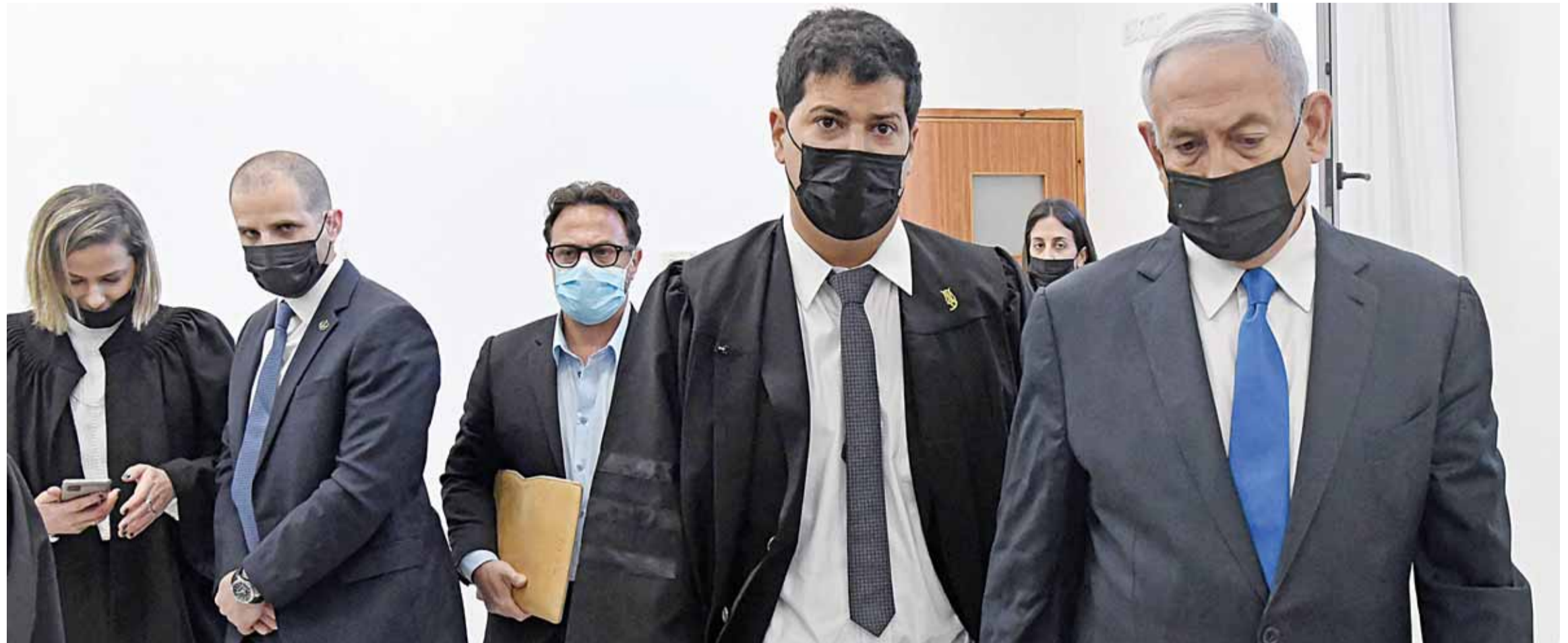
JERUSALEM: Israeli Prime Minister Benjamin Netanyahu walks as he talks to his lawyer ahead of a hearing in his corruption trial at the Jerusalem district court yesterday.