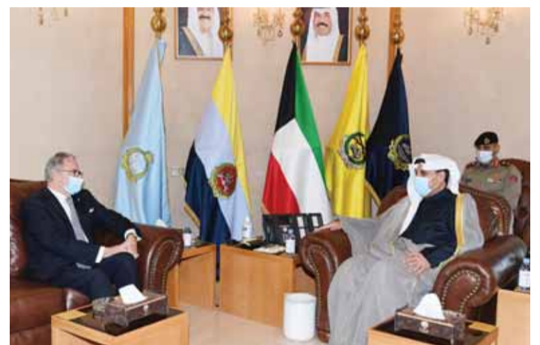
Deputy Prime Minister and Minister of Defense Sheikh Hamad Jaber Al-Ali Al-Sabah meets Belgium's Ambassador to Kuwait Leo Peeter.