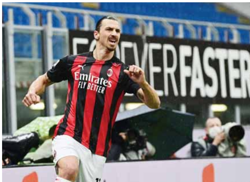
MILAN: AC Milan's Swedish forward Zlatan Ibrahimovic celebrates after opening the scoring during the Italian Serie A football match AC Milan vs Crotone on Sunday at the San Siro stadium in Milan.

The former Sweden striker returned to Milan in January 2020 and has scored 27 goals in 37 appear-