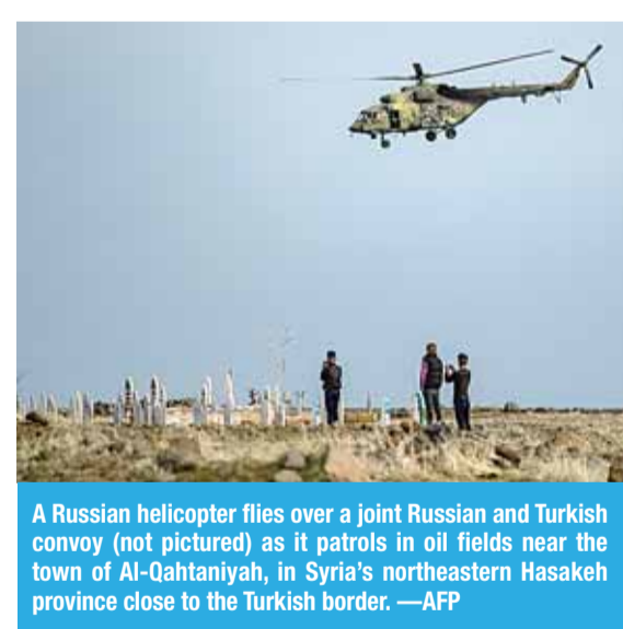
A Russian helicopter flies over a joint Russian and Turkish convoy (not pictured) as it patrols in oil fields near the town of Al-Qahtaniyah, in Syria's northeastern Hasakeh province close to the Turkish border. —AFP

Borrell is expected to meet with foreign ministers from the 27 EU states on February 22 to discuss fresh sanctions against Moscow that would require an unanimous vote among the EU members. —AFP