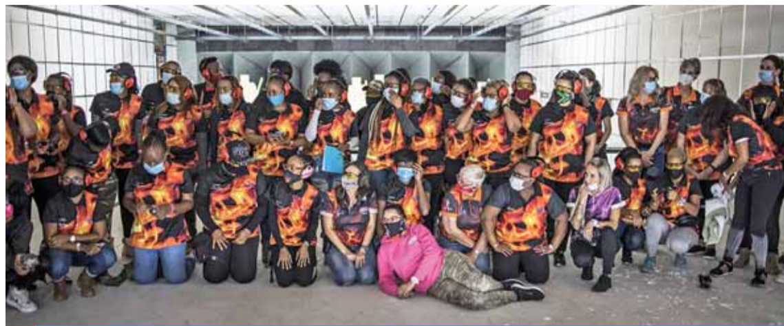
MIDRAND: Participants, fire range officers and instructors pose for a group photograph during a training organized by the women empowerment group Girls on Fire, in Midrand, on Sunday. — AFP

The plot was an "attempted coup d'etat," according to Justice Minister Rockefeller Vincent, with authorities saying at least 23 people have been arrested, including a top judge and an official from the national police. "I thank my head of security at the palace. The