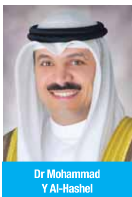
Dr Mohammad Y Al-Hashel

The CBK Governor pointed out the three commemorative coins were designed to clearly evoke these patriotic occasions and are gold-plated pure silver minted according to international standards. Those wishing to purchase any of the coins may do so from CBK