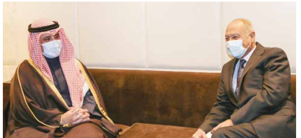
CAIRO: Kuwait's Foreign Minister Sheikh Dr Ahmad Nasser Al-Mohammad Al-Sabah meets Arab League Secretary-General Ahmad Abul Gheit in Cairo, Egypt yesterday.

Sheikh Dr Ahmad also met with Palestinian