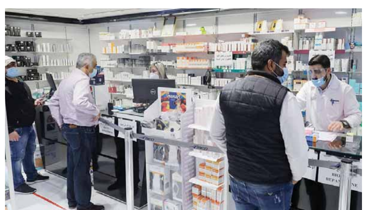
BEIRUT: Customers buy medicine at a pharmacy in the Lebanese capital Beirut, on February 2, 2021. — AFP

Moreover, subsidized medicine is being smuggled out of Lebanon, Gebara said. In recent months, travellers have been stopped at Beirut airport trying to fly out to Egypt or Iraq with bags filled with subsidized medicine - some of which turned up as far as the Democratic Republic of Congo. All in all, "it's an alarming situation that keeps on feeding off itself", Gebara added. — AFP