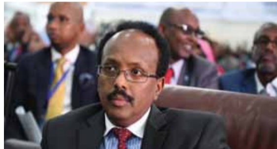
MOGADISHU: The opposition alliance urged President Mohamed Abdullahi Mohamed to "respect the constitution" by standing aside and allowing for a peaceful transfer of power.

The Horn of Africa nation was supposed to choose the next president on February 8 but the deadline was missed as the central government and federal states failed to break a deadlock over how to proceed with a vote. The country now confronts a constitutional crisis alongside a violent Islamist insurgency, a locust invasion and serious food shortages.