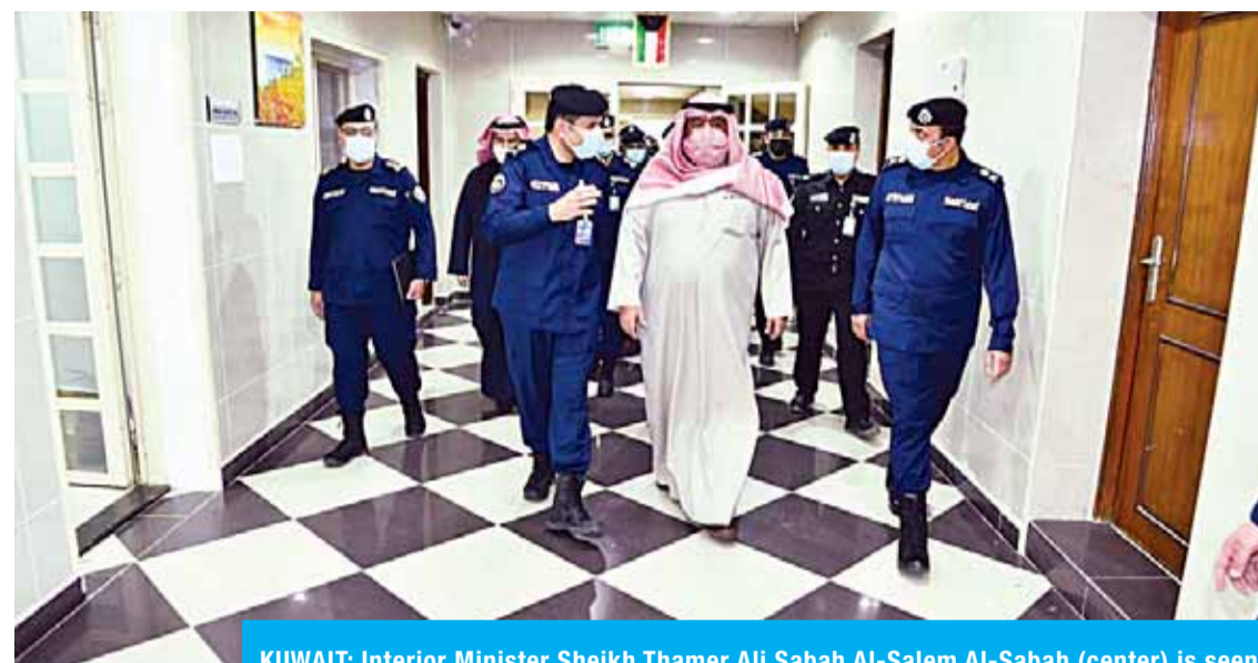
KUWAIT: Interior Minister Sheikh Thamer Ali Sabah Al-Salem Al-Sabah (center) is seen during the tour.