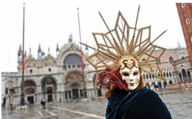
A Venetian artisan wearing a carnival mask and costume takes part in a demonstration of The Confederation of Venice Artisans (Confartigianato Venezia) at St Mark's square in Venice.