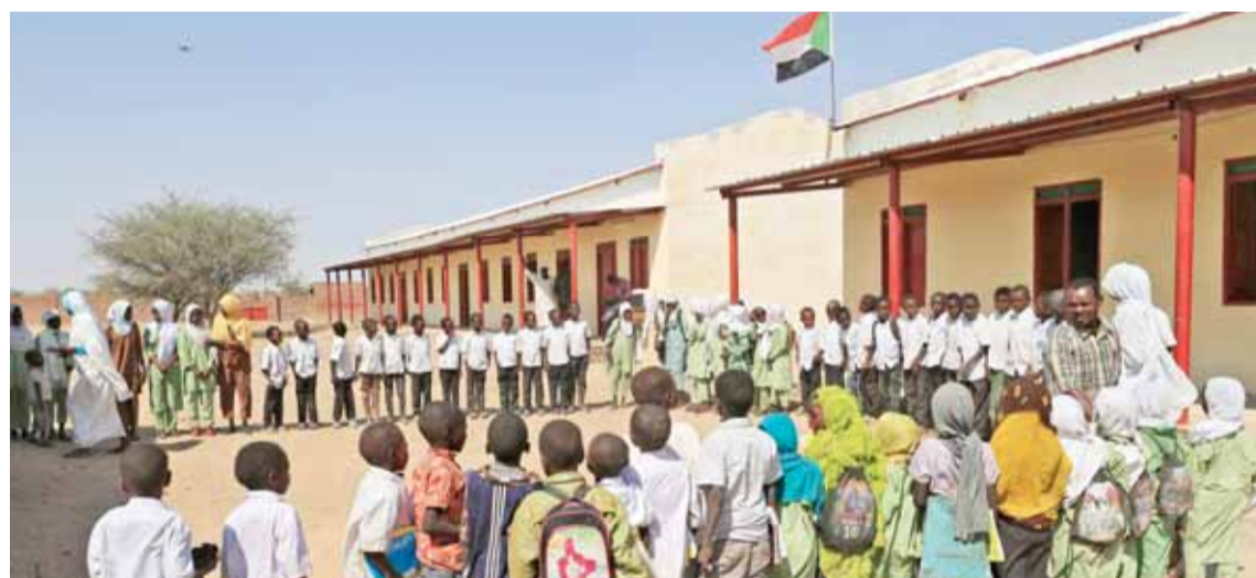
A picture taken in the South Darfur village of Hamada, north of the region's capital town Nyala shows children at a school as residents return to the village.