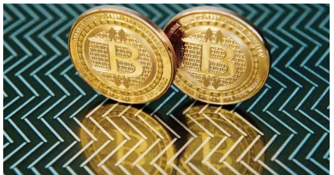
This file shows bitcoin medals. Tesla has invested $1.5 billion in bitcoin, a decision that came just days after the electric carmaker's CEO Elon Musk changed his Twitter bio to simply read "#bitcoin".