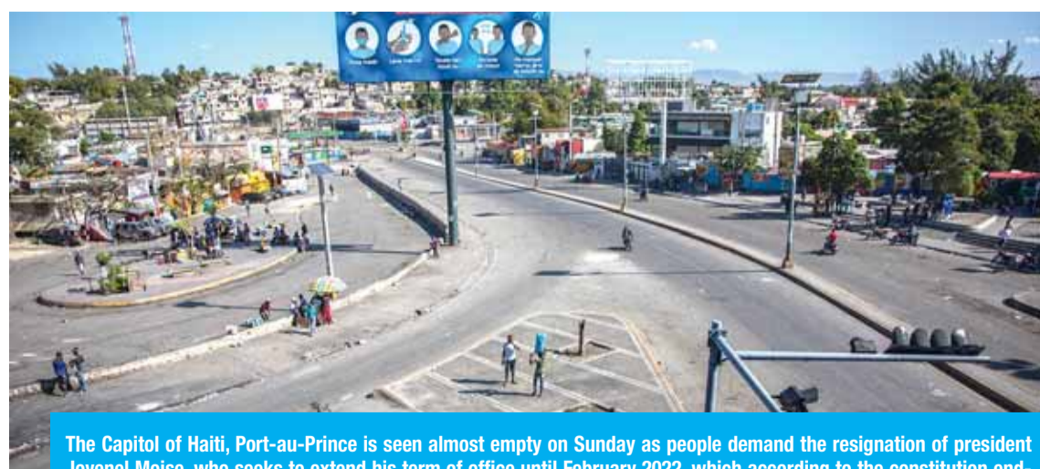
The Capitol of Haiti, Port-au-Prince is seen almost empty on Sunday as people demand the resignation of president Jovenel Moise, who seeks to extend his term of office until February 2022, which according to the constitution ended yesterday.

This election was to follow a complex indirect system after hopes of hosting Somalia's first one-person, one-vote ballot since 1969 was abandoned over security and political problems. Under this system, which mirrors past elections, special delegates chosen by Somalia's myriad clan elders pick lawmakers, who in turn choose the president.