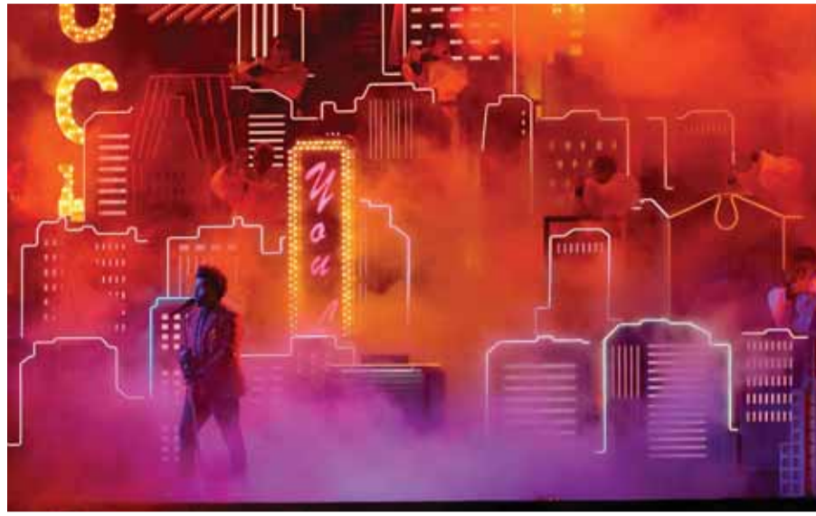
Pictures show The Weeknd performs during the Pepsi Super Bowl LV Halftime Show at Raymond James Stadium in Tampa, Florida.

Gorman, meanwhile, became the first-ever poet to perform at the National Football League championship, America's most-watched broadcast of the year. In a pre-taped performance, the 22-year-old delivered her poem "Chorus of the Captains," paying homage to three people declared honorary captains in the night's coin toss: an educator, an intensive care nurse and a US