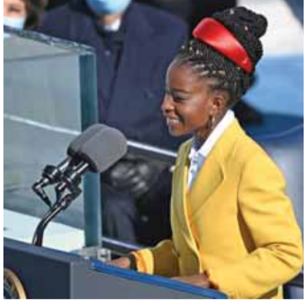
In this file photo National youth poet laureate Amanda Gorman recites during the inauguration of Joe Biden as the 46th US President at the US Capitol in Washington, DC.

Amanda Gorman, the young poet who delivered a captivating performance at President Joe Biden's inauguration, opened the Super Bowl on Sunday with a new work celebrating essential workers, while The Weeknd performed a pandemic-era halftime show to headline one of pop's most visible