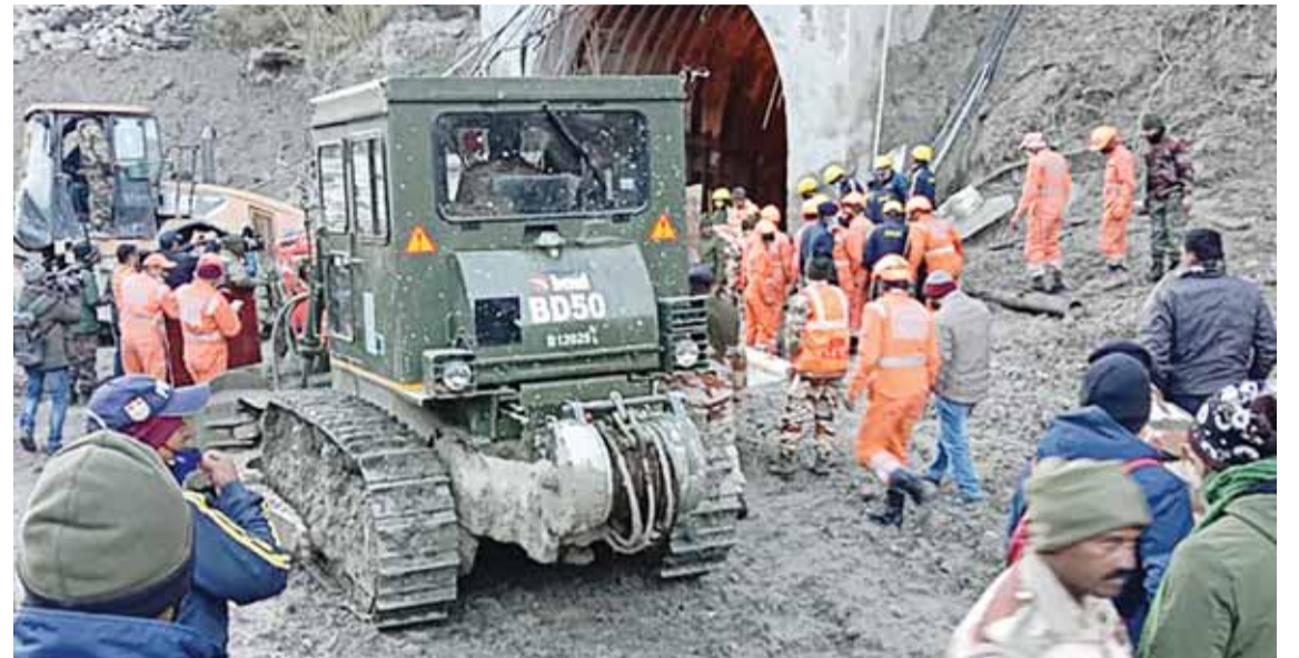
This handout photo taken yesterday and released by the Indo-Tibetan Border Police (ITBP) shows members of the Indo-Tibetan Border Police (ITBP) during a rescue operation after a broken glacier caused a major river surge that swept away bridges and roads, at a tunnel near Tapovan dam in Chamoli district of Uttarakhand.

Glaciers in the region have been shrinking rapidly in recent years because of global warming, but