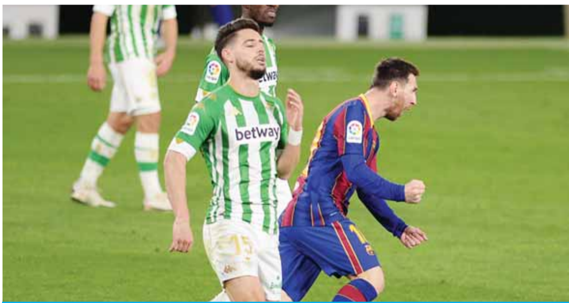
SEVILLE: Barcelona's Argentinian forward Lionel Messi (right) celebrates after scoring a goal during the Spanish league football match between Real Betis and FC Barcelona at the Benito Villamarin stadium in Seville on Sunday.

Betis will wonder how they managed not to