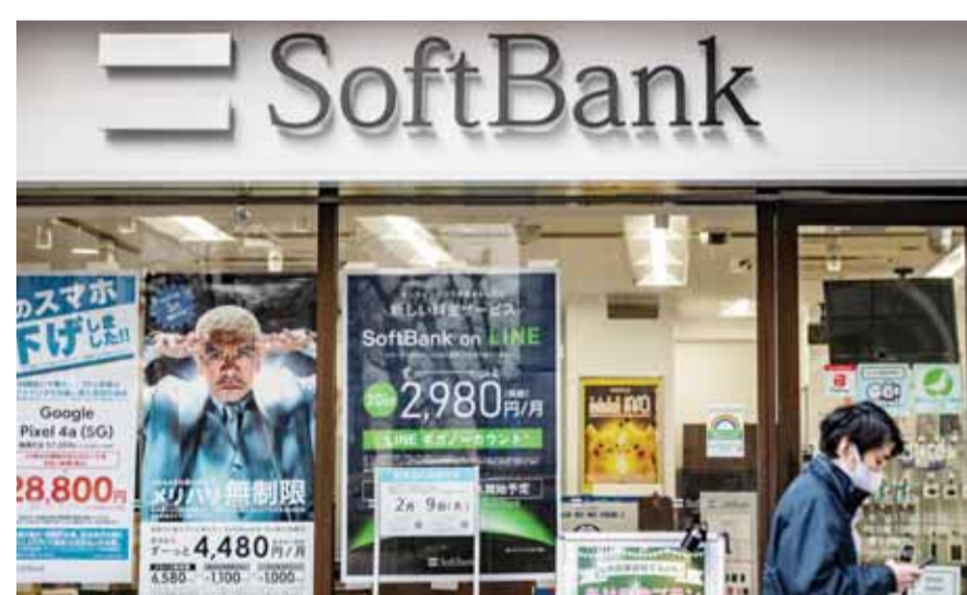
TOKYO: A pedestrian walks past a shop of SoftBank Group along a street in Tokyo yesterday ahead of the company's earnings reports expected after the markets close later in the day. — AFP

SoftBank has invested heavily in tech-based start-ups including ride-hailing