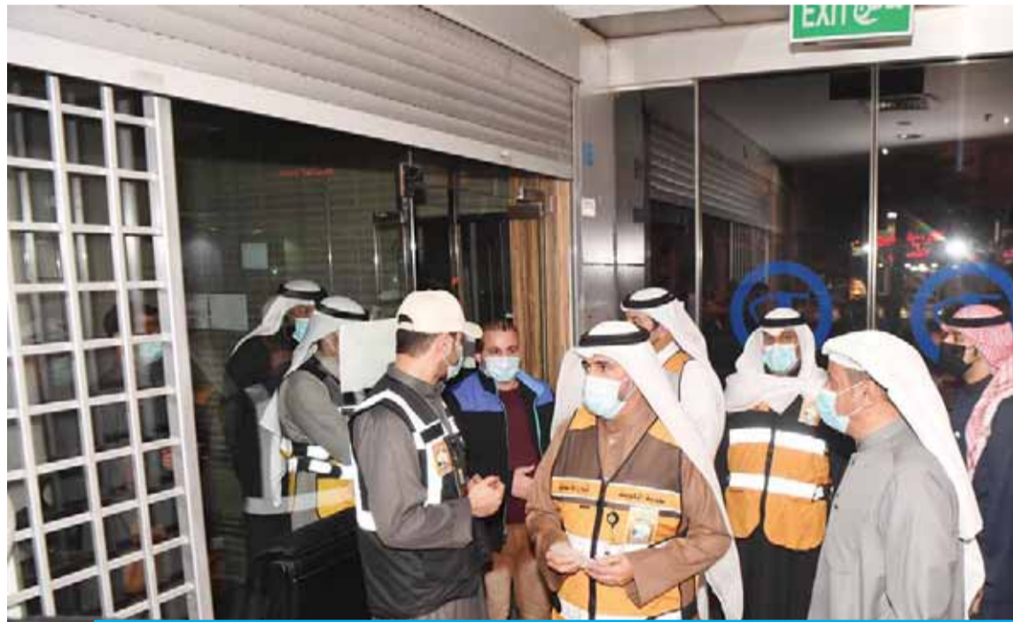
KUWAIT: Municipal inspectors are making sure all commercial establishments close by 8 pm.

Assembly panels OK amnesty, permanent residency for Kuwaiti women's kids