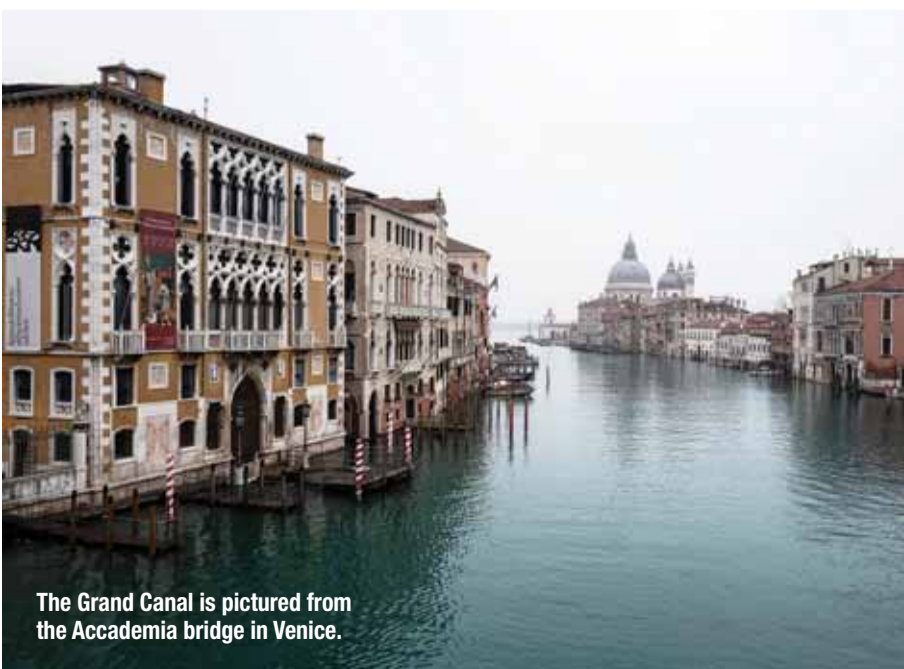
The Grand Canal is pictured from the Accademia bridge in Venice.