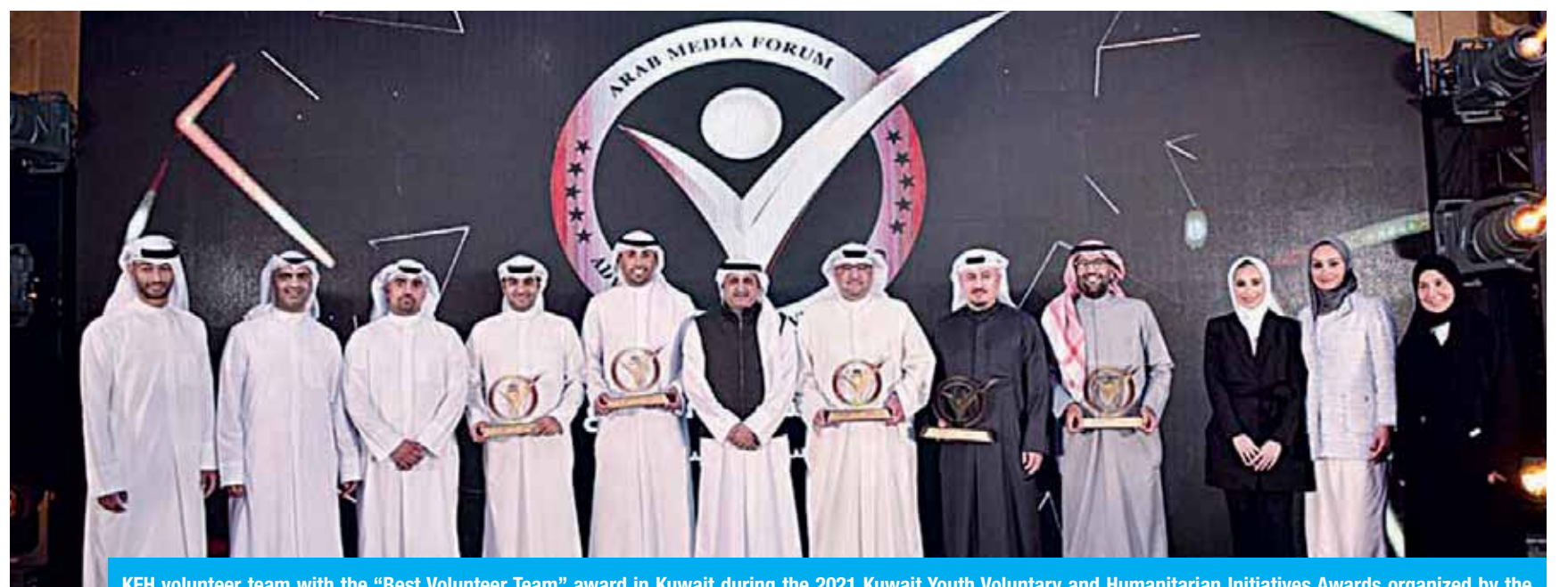
KFH volunteer team with the "Best Volunteer Team" award in Kuwait during the 2021 Kuwait Youth Voluntary and Humanitarian Initiatives Awards organized by the Arab Media Forum