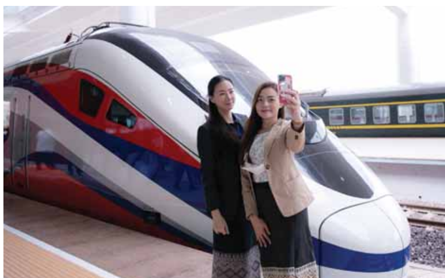
VIENTIANE, Laos: Two women pose for photos with the bullet train at the China-Laos railway Vientiane station in the Laos capital Vientiane.

Laos Prime Minister Phankham Viphavanh-installed in March-hopes to reduce debt from 72 percent to 64.5 percent of GDP by the end of 2023. But in the meantime, Laos owes $1.16 billion per year between 2022 and 2025, Fitch Ratings says. Its public debt is higher than most regional counterparts-including Cambodia, Vietnam and the