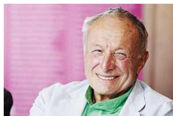
British architect Lord Richard Rogers

He left school in 1951 with no qualifications and, after his army national service, managed to gain entry into London's Architectural Association School, known for its modernism. He completed his architecture studies at Yale in the United States in 1962, where he met fellow Brit Norman Foster. They returned to England in 1964 and with their wives founded the architecture firm "Team 4", which became known for its technology-inspired designs. In