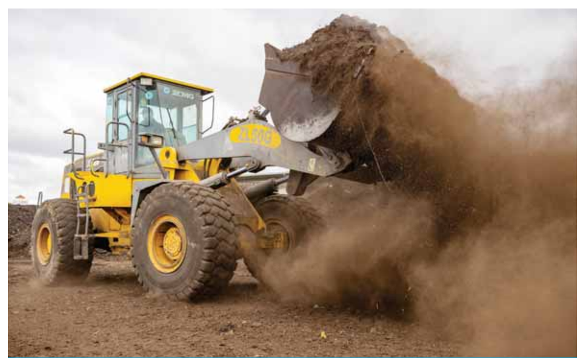
MEKNES, Morocco: A front loader transports organic waste in the Elephant Vert factory in the "Agropolis" industrial zone in Morocco's northern city of Meknes.

Medical professionals said a long-term solution involved developing Turkey's health industry to wean it off its dependence on imports. But today, pharma-