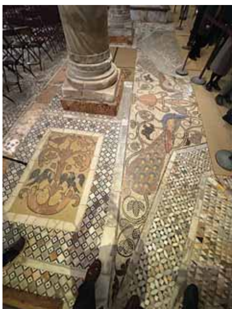
Mosaic floor with peacocks

Rogers completed some 400 commissions in a career punctuated by big-statement, skyline-defining buildings characterized by light structures, prefabricated materials and use of cutting-edge technology. He designed the European Court of Human Rights in Strasbourg, Potsdamer Platz offices in Berlin, an airport terminal in Madrid and Three World Trade Center in New York. He was also behind London's vast white marquee with yellow crane supports known as the Millennium Dome and then the O2 Centre, a popular venue for events from pop concerts to tennis competitions. The "Cheesegrater", as the 225-metre-tall (738 feet) Leadenhall office building in central London is known because of its sleek wedge shape, opened in 2014. Although buildings were Rogers' world, he insisted it was the space around them that was the key in defining those that worked. "The two can't be judged apart," he told The Guardian in 2017. "The Twin Towers in New York, for instance. They weren't great buildings, but the space between them was." He has been married twice. One of his five sons died in 2011. —AFP