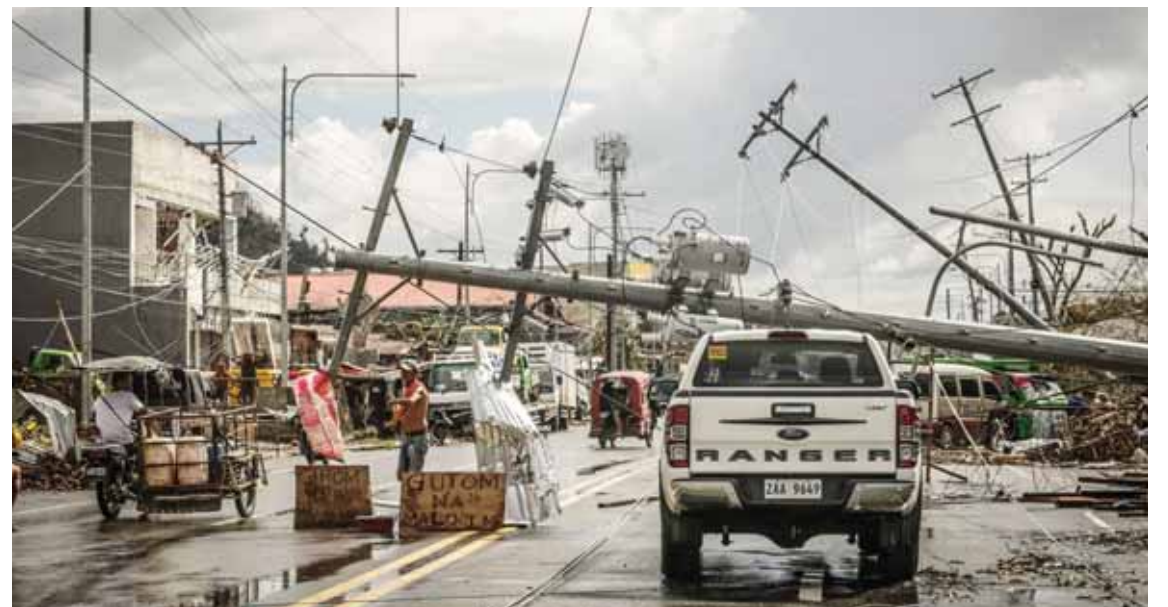
SURIGAO CITY, Philippines: Fallen electric pylons block a road while a sign asking for food (L) is displayed along a road in Surigao City, Surigao del norte province, yesterday, days after super Typhoon Rai devastated the city.

There has also been widespread destruction on Siargao, Dinagat and Mindanao islands, which bore the brunt of Rai when it slammed into the Philippines.