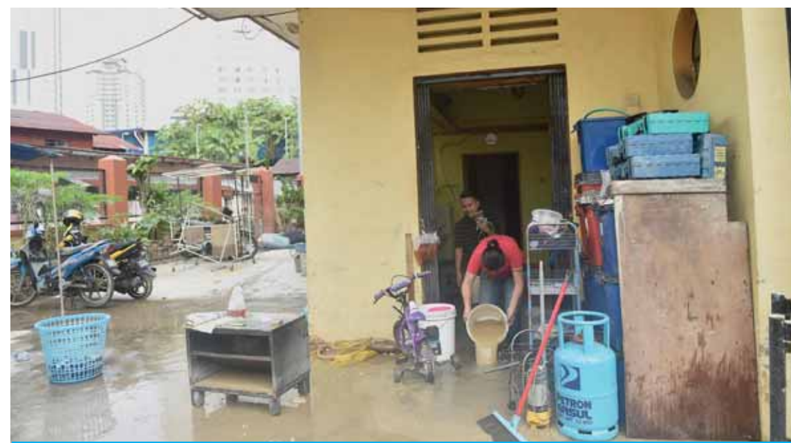
KUALA LUMPUR: People clean up their house after it was hit by flood in Kuala Lumpur Malaysia yesterday.