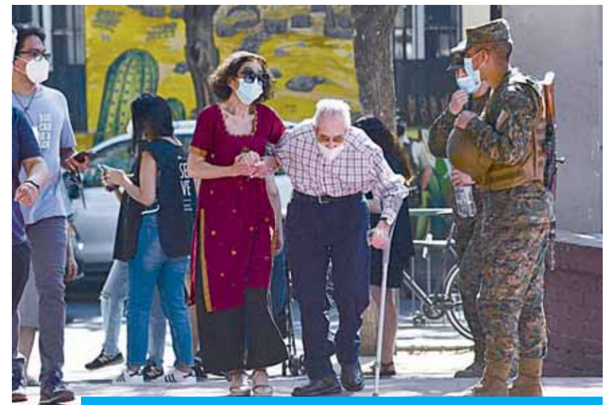
SANTIAGO: A man arrives to a polling station in Santiago, during the runoff presidential election in Chile, yesterday.

Chile has a high abstention rate, with about 50 percent of its 15 million eligible voters regularly giving the ballot box a wide berth. The country is