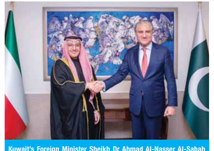
Kuwait's Foreign Minister Sheikh Dr Ahmad Al-Nasser Al-Sabah meets Minister of Foreign Affairs of Pakistan Makhdoom Shah Mahmood Qureshi.

ISLAMABAD: Kuwait believes that it is imperative that Afghans get access to much needed aid as Kabul copes with a worsening humanitarian crisis, its foreign minister said yesterday. Leading Kuwait's delegation to the Pakistan-hosted Organization of Islamic Cooperation (OIC) talks on Afghanistan, Sheikh Dr Ahmad Al-Nasser Al-Sabah said the Islamic world is in the throes of a myriad of challenges, chief among them the "humanitarian crisis" unfolding in Afghanistan.