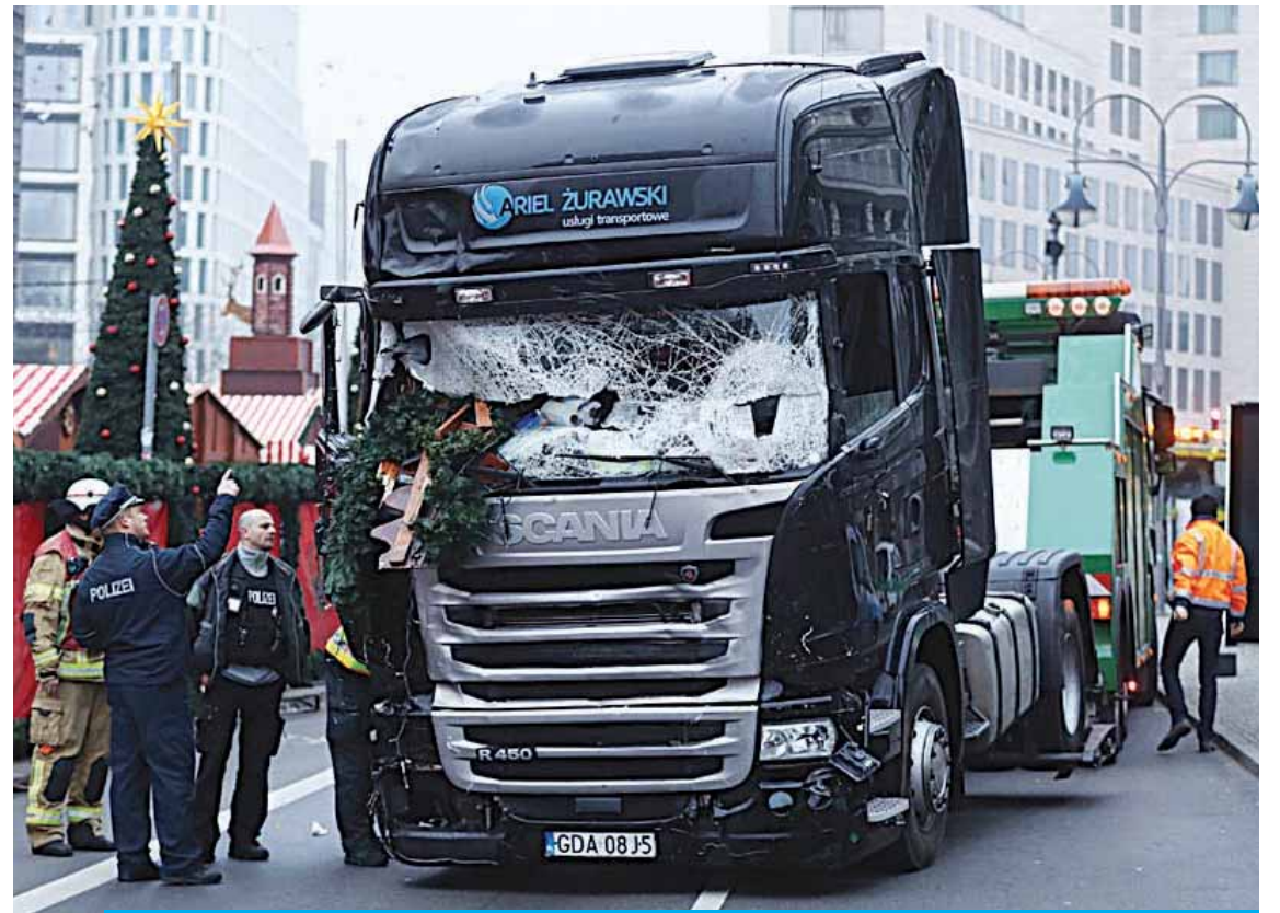
BERLIN: File photo shows the truck that ploughed through the Christmas market in Berlin.