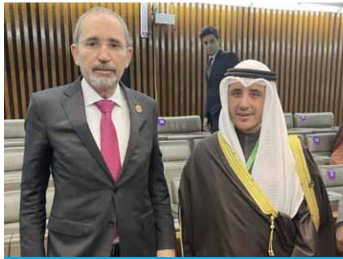
Kuwait's Foreign Minister Sheikh Dr Ahmad Al-Nasser Al-Sabah meets his Jordanian counterpart Ayman Safadi.