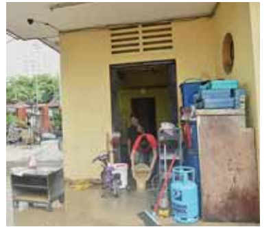
Floods in Malaysia displace more than 30,000 people

Five years after Berlin attack, Germany remembers its victims