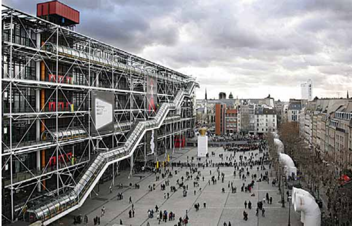
Photo shows the Pompidou Centre, designed by British architect Richard Rogers.