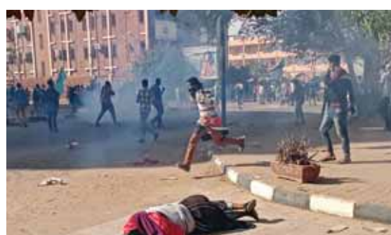
KHARTOUM: A wounded Sudanese protester falls on the pavement after security forces fired tear gas during a rally yesterday to mark three years since the start of mass demonstrations.

The move alienated many of Hamdok's pro-democracy supporters, who dismissed it as provid-