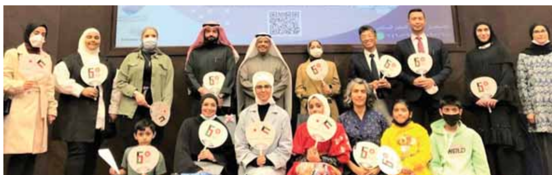
KUWAIT: A group picture of the participants in the contest.