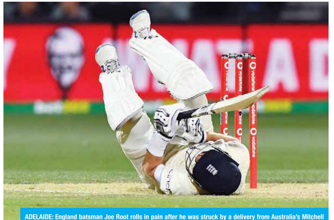
ADELAIDE: England batsman Joe Root rolls in pain after he was struck by a delivery from Australia's Mitchell Starc on the fourth day of the second Ashes cricket Test match in Adelaide yesterday.

Earlier, Marnus Labuschagne and Travis Head both made 51 for Australia, steadying the innings