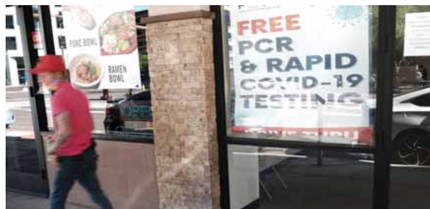
PHOENIX, US: A sign advertises COVID testing in downtown Phoenix where new COVID-19 cases are down but health experts warn cases may rise with the introduction of the Omicron strain on Saturday.

Wall Street has also been forced to adjust to the rising number of COVID cases in New York City and other financial centers. As of Tuesday, JPMorgan was restricting access to nine of its buildings in Manhattan to