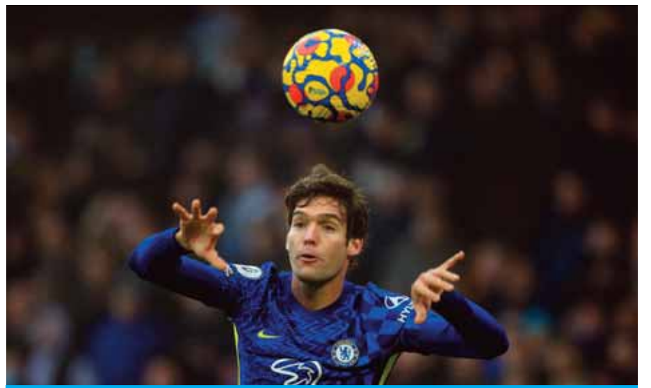
WOLVERHAMPTON: Chelsea's Spanish defender Marcos Alonso takes a throw in during the English Premier League football match between Wolverhampton Wanderers and Chelsea yesterday. — AFP

But relegation-threatened Newcastle remain three points from safety having now played two games more than Watford, who are just outside the drop zone. The Magpies' wealthy new Saudi-backed owners have indicated they will invest signifi-