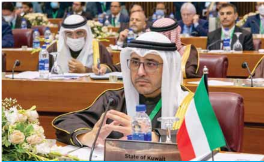
ISLAMABAD: Kuwait's Foreign Minister Sheikh Dr Ahmad Al-Nasser Al-Sabah attends the Organization of Islamic Cooperation's talks on Afghanistan.

Afghanistan must not turn into hotbed of extremism: Kuwait's FM