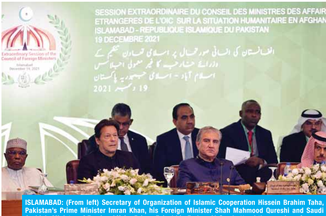
ISLAMABAD: (From left) Secretary of Organization of Islamic Cooperation Houssein Ibrahim Taha, Pakistan's Prime Minister Imran Khan, his Foreign Minister Shah Mahmood Qureshi and Saudi Arabia's Minister of Foreign Affairs Prince Faisal bin Farhan Al-Saud attend the opening of a special meeting of the OIC yesterday.

Kuwait has provided Afghanistan with aid worth $92m