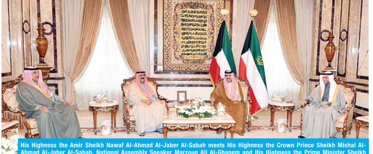
His Highness the Amir Sheikh Nawaf Al-Ahmad Al-Jaber Al-Sabah meets His Highness the Crown Prince Sheikh Mishal Al-Ahmad Al-Jaber Al-Sabah, National Assembly Speaker Marzouq Ali Al-Ghanem and His Highness the Prime Minister Sheikh Sabah Al-Khaled Al-Hamad Al-Sabah.

KUWAIT: His Highness the Amir Sheikh Nawaf Al-Ahmad Al-Jaber Al-Sabah sent a congratulatory cable Saturday to Qatari Amir Sheikh Tamim bin Hamad Al Thani on the success of the 2021 FIFA Arab Cup. In the cable, His Highness the Amir lauded big preparations and arrangements made by Qatar at all stadiums and facilities for the participating teams that contributed to the progress of the event and the achievement of the desired goals. His Highness the Amir also com-