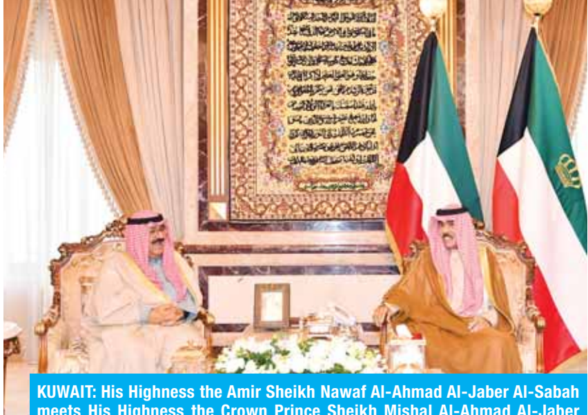
KUWAIT: His Highness the Amir Sheikh Nawaf Al-Ahmad Al-Jaber Al-Sabah meets His Highness the Crown Prince Sheikh Mishal Al-Ahmad Al-Jaber Al-Sabah.