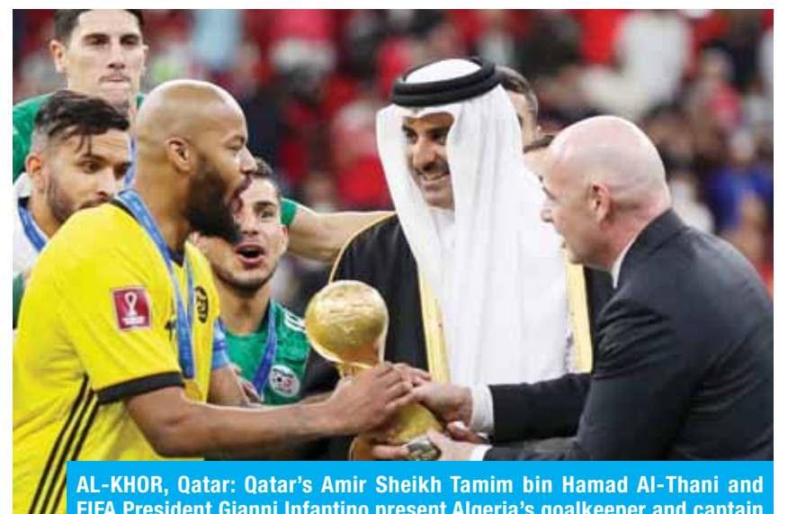
AL-KHOR, Qatar: Qatar's Amir Sheikh Tamim bin Hamad Al-Thani and FIFA President Gianni Infantino present Algeria's goalkeeper and captain Rais M'Bolhi with the FIFA Arab Cup 2021 trophy at the Al-Bayt stadium on Saturday.