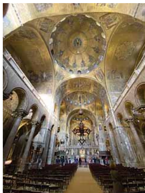
The church's interior architecture.