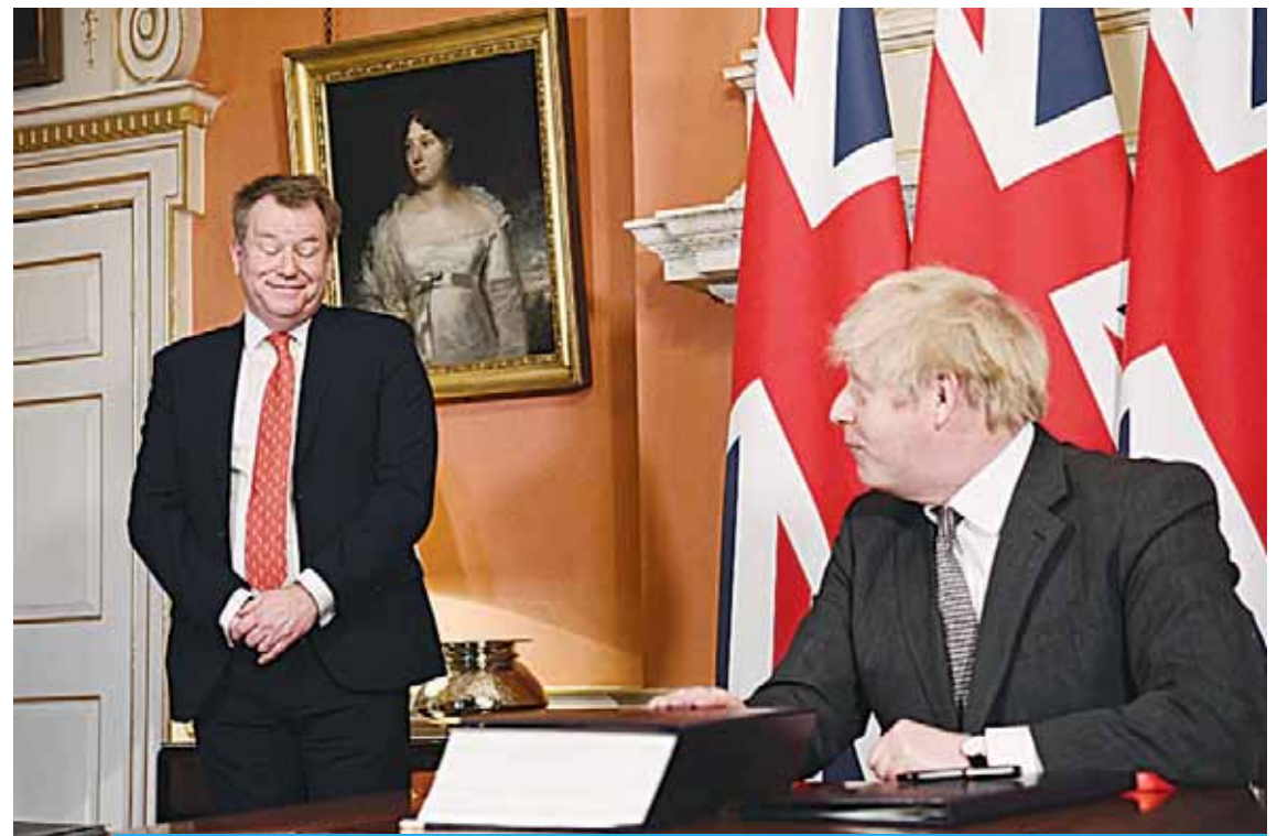
LONDON, UK: In this file photo taken on December 30, 2020 UK chief trade negotiator, David Frost (left) looks on as Britain's Prime Minister Boris Johnson signs the Trade and Cooperation Agreement between the UK and the EU, the Brexit trade deal, at 10 Downing Street in central London.

The series of crises engulfing Johnson have