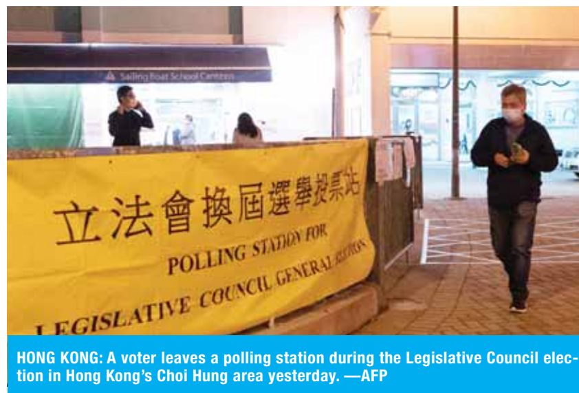
HONG KONG: A voter leaves a polling station during the Legislative Council election in Hong Kong's Choi Hung area yesterday.

The government bought up newspaper front pages and billboards, sent flyers to every household, pinged mobile phones with reminders to vote and made public transport free for the day. Despite the publicity blitz, the latest polls showed only 48 percent of respondents said they would