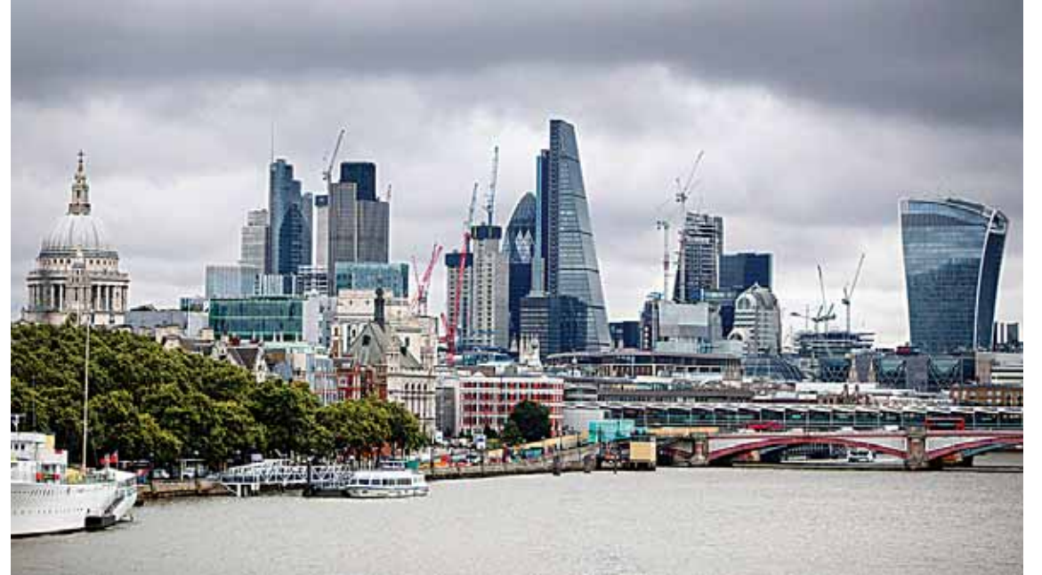
Construction cranes stand near skyscrapers in the City of London, including the Heron Tower, Tower 42, 30 St Mary Axe commonly called the 'Gherkin', the Leadenhall Building, designed by Richard Rogers and commonly called the 'Cheesegrater', and 20 Fenchurch Street, commonly called the 'Walkie-Talkie' building, as they are pictured from Waterloo Bridge in London.

British architect Richard Rogers designed a series of landmark buildings around the world, including London's "Cheesegrater" and the famous multi-colored, pipe-covered Pompidou arts centre in Paris. Rogers died Saturday night aged 88, according to Britain's Press Association, which cited his spokesperson. One of his sons also confirmed his death to the New York Times, but did not give the cause.