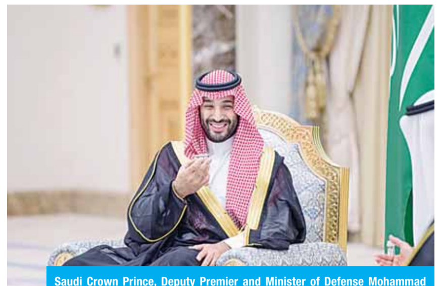
Saudi Crown Prince, Deputy Premier and Minister of Defense Mohammad bin Salman bin Abdulaziz Al-Saud.

The GCC official noted that both countries are economic partners, given that their two-way trade exchange