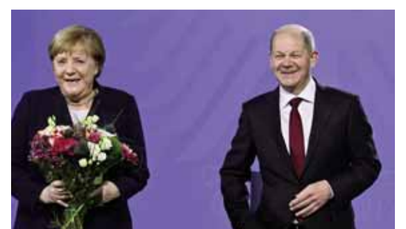
BERLIN: German Chancellor Olaf Scholz and his predecessor Angela Merkel pose after Scholz gave Merkel a bouquet of flowers during a handover ceremony at the Chancellery yesterday.

Merkel wished Scholz luck as chancellor, urging him to "take this office and work in the best interest of our country". She then left office by motorcade for the last time as her staff looked on, applauding. Scholz led his Social Democrats from a deep poll deficit to victory in the September 26 election.