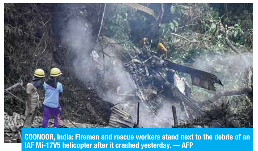
COONOR, India: Firemen and rescue workers stand next to the debris of an IAF Mi-17V5 helicopter after it crashed yesterday.