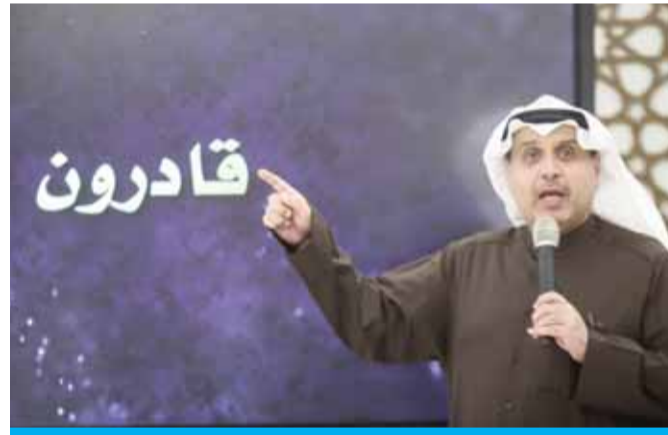
KUWAIT: Defense Minister Sheikh Hamad Jaber Al-Ali Al-Sabah speaks during a press conference yesterday.

KUWAIT: Deputy Prime Minister and Defense Minister Sheikh Hamad Jaber Al-Ali Al-Sabah yesterday announced registration of Kuwaiti women in the army will start on Dec 19. "We have not forced women to join the army - we only gave them the opportunity to get the same benefits as male officers in the army," he told a press conference. He explained Kuwaiti women are already working at the ministry, but as civilians, which makes them lose the financial benefits paid to officers.