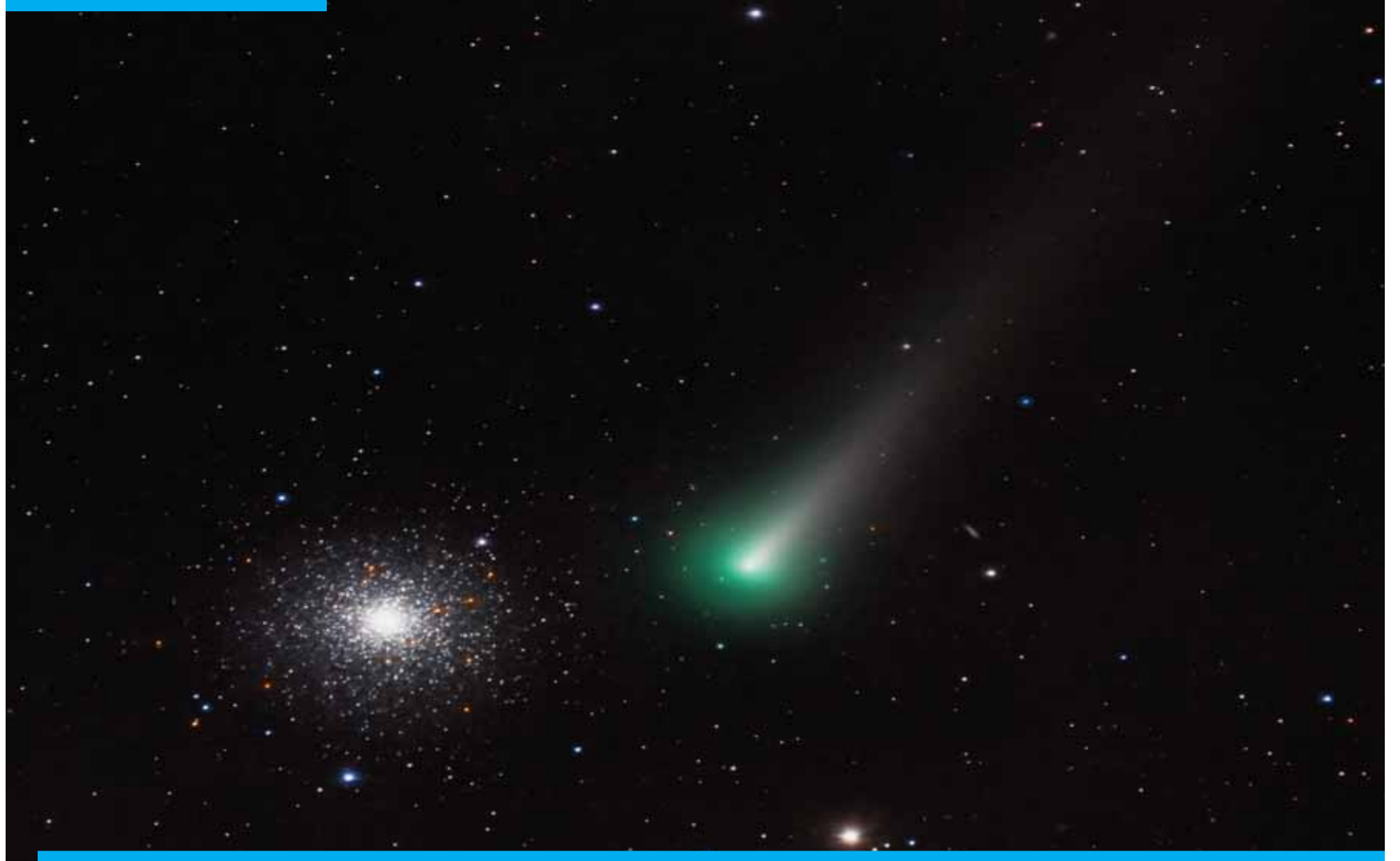
KUWAIT: This photo taken by Kuwaiti astrophotographer Abdullah Al-Harbi shows Comet Leonard falling beside the M3 cluster as seen from Kuwait's sky. The comet, which was discovered in 2021, is currently passing through Kuwait's sky, and is expected to be at its brightest point on December 12.