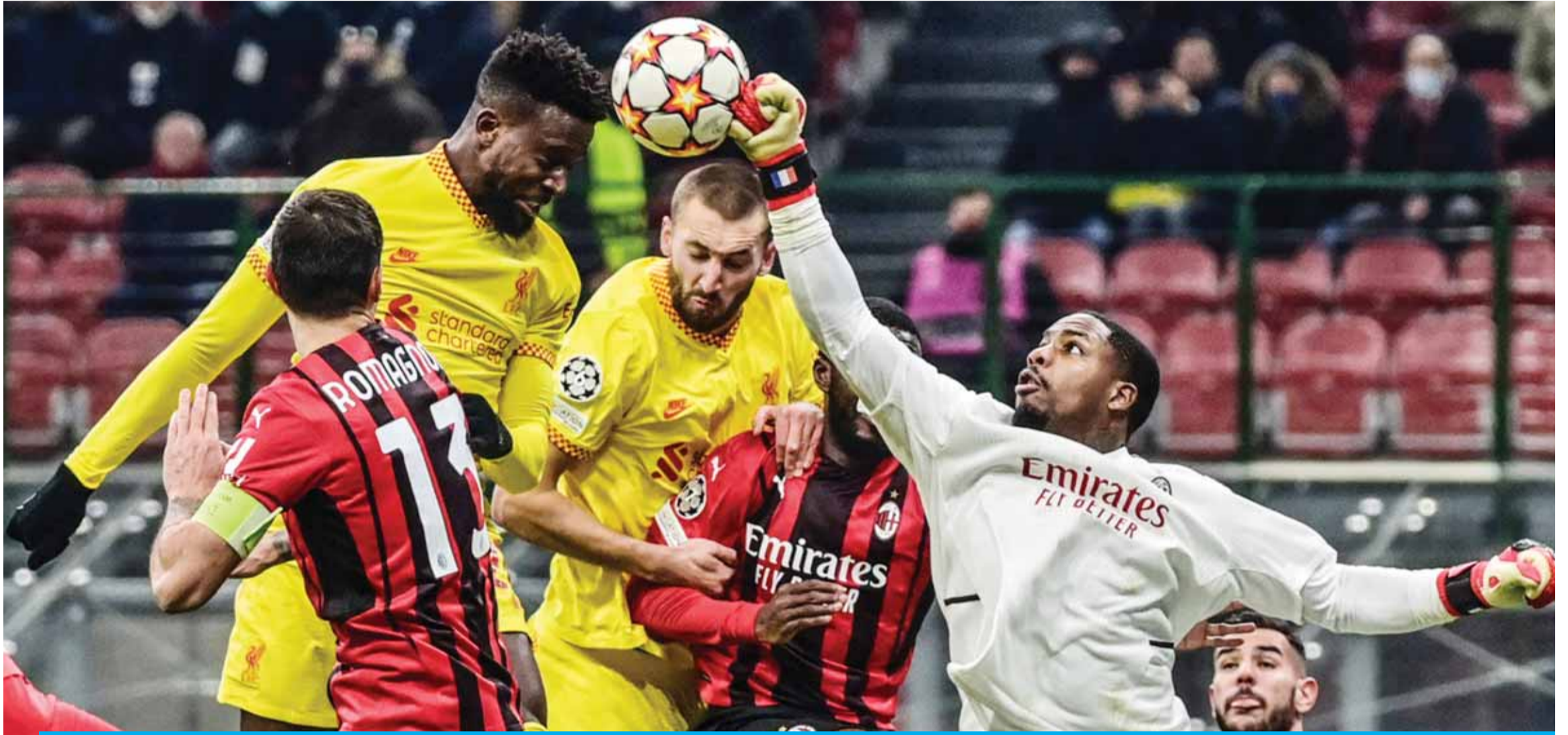
MILAN: Liverpool's Belgian forward Divock Origi (Top left) and AC Milan's French goalkeeper Mike Maignan (right) go for the ball during the UEFA Champions League Group B football match between AC Milan and Liverpool on December 7, 2021.

Atletico qualify; Walker sent off as Man City crash at RB Leipzig