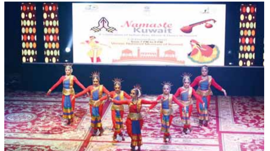
A dance performance by Shivadham School of Dance.