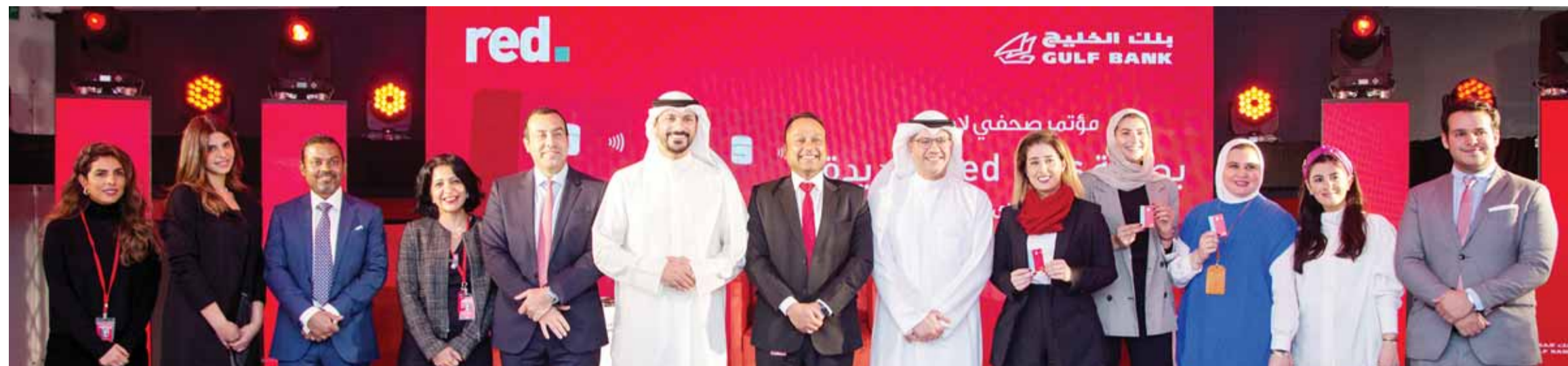
GBK team after the press conference

Red plus card offers the youth segment access to the highest cashback program in Kuwait