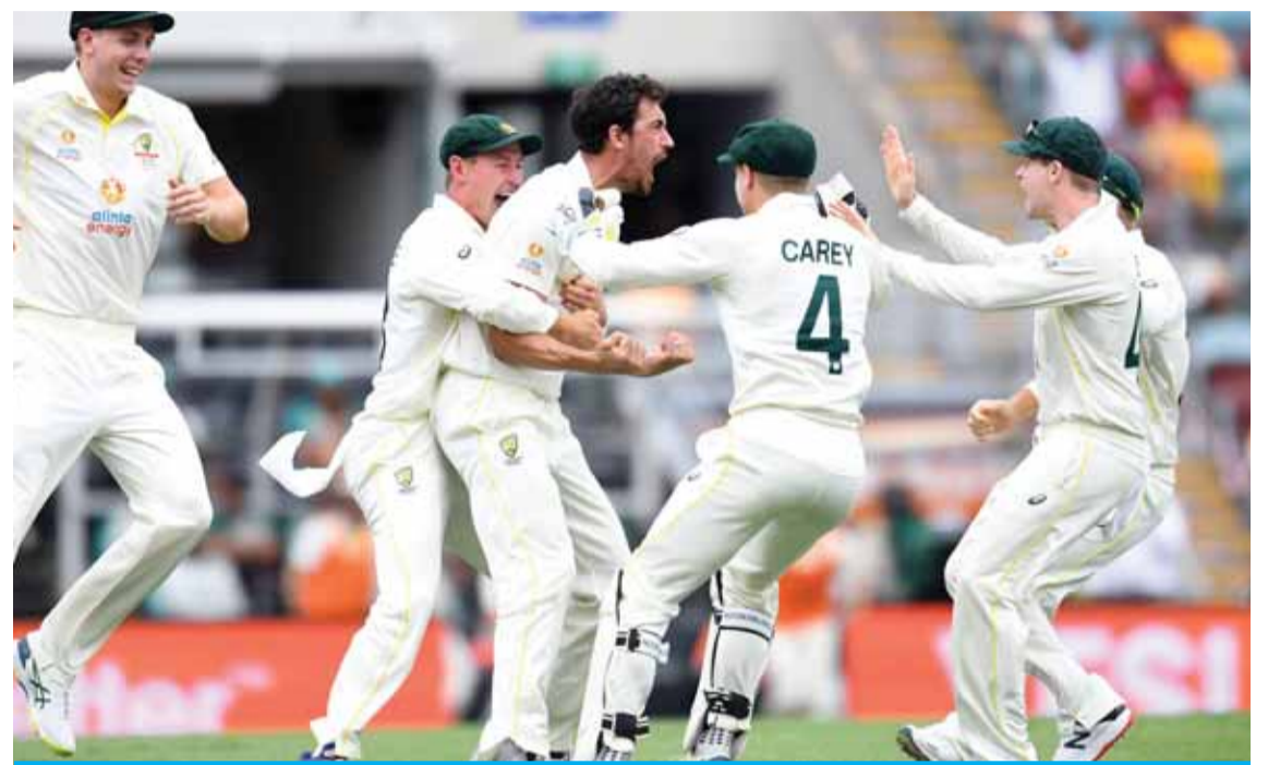
BRISBANE: Mitchell Starc of Australia (center) celebrates taking the wicket of England's Rory Burns with the first ball of the match during day one of the first Ashes cricket Test match between England and Australia yesterday.

Earlier Root had taken the brave decision to bat in the bowler-friendly conditions. Brisbane has been experiencing a wet start to the summer, washing out most of the tourists' scheduled warm-up games. Having had little chance to become acclimatized to