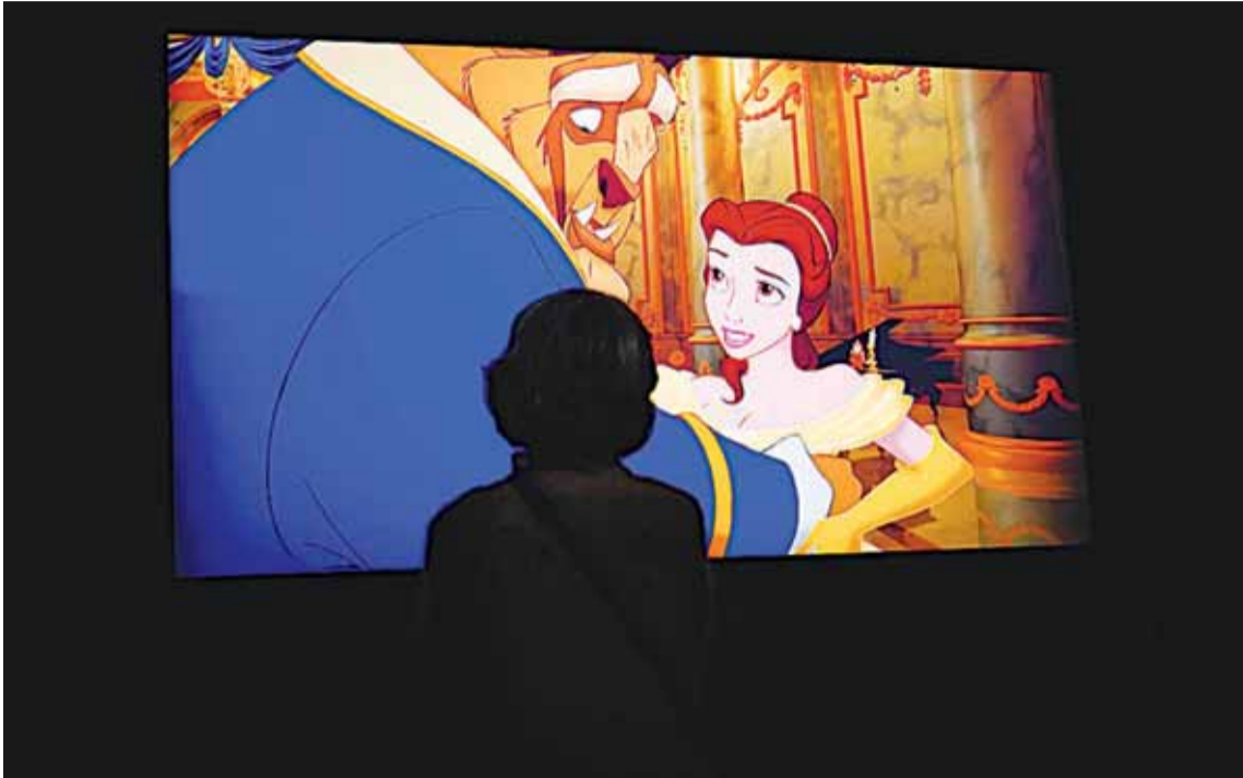
People look at a screen during a press preview for "Inspiring Walt Disney: The Animation of French Decorative Arts" at the Met in New York.