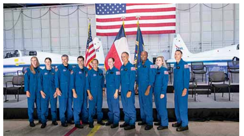
(From left) Astronaut candidates pose for a group photo at the NASA's 2021 Astronaut Candidate announcement event on December 6, 2021 at Ellington Field in Houston, Texas.