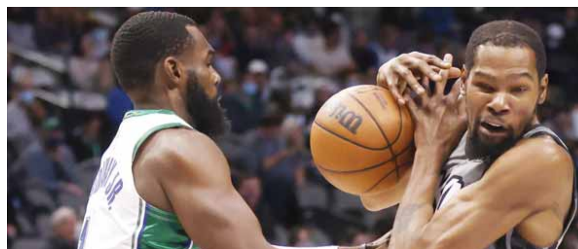
DALLAS: Kevin Durant #7 of the Brooklyn Nets and Dorian Finney-Smith #10 of the Dallas Mavericks battle for control of the ball in the first half at American Airlines Center on November 7, 2021.

Nash said Tuesday's victory augured well for the rest of the season. "I'm proud of the way we've been able to find solutions and win games," Nash said. "We're knocking on the door of elevating our play into a little bit higher category." Dallas were left ruing their inability to strike from distance. Doncic led the Mavs scorers with 28 points, but Dallas paid the price for making just nine of 46 attempts from three-point range.