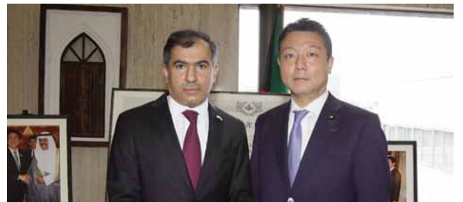
TOKYO: (From left) Kuwaiti Ambassador Hasan Mohammad Zaman and Japanese Parliamentary Vice-Minister for Foreign Affairs Taro Honda.

The exhibition held in the embassy premises with some 40 photos, showed not only images of mutual visits of the high-rank officials, such as the visit to Japan by Kuwait's late Amir Sheikh Sabah Al-Ahmad Al-Jaber Al-Sabah in 2012 and former Japanese Prime Minister Shinzo Abe's visit to Kuwait in 2013, but also depicted memorable scenes of bilateral cooperation and people-to-people exchanges of the two countries over the past 60 years. The opening ceremony of the exhibition was attended by some 50 guests, including Japanese Parliamentary Vice-Minister for Foreign Affairs Taro Honda, Governor of Tokyo Yuriko Koike, Chairman of the Japan-Kuwait Parliamentary Friendship League Eisuke Mori, senior government officials, political