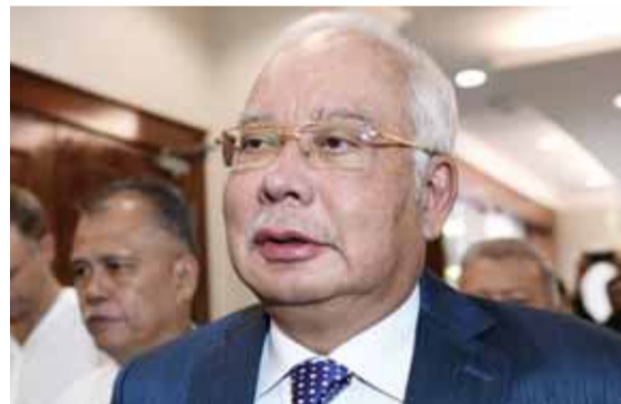
KUALA LUMPUR: File photo taken on August 19, 2019 shows Malaysia's former prime minister Najib Razak arriving at the Kuala Lumpur High Court for his trial over 1MDB corruption allegations in Kuala Lumpur.

But he agreed to a request for Najib to stay out of prison on bail while he lodges a final appeal with Malaysia's top court. Najib has been making a political comeback in recent months, campaigning for his party and presenting himself as a man of the people who defends the interests of the ethnic