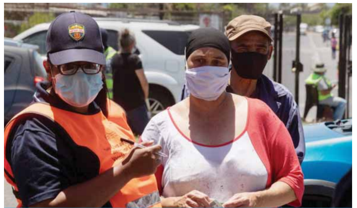
CAPE TOWN: A member of the Western Cape Metro EMS (Emergency Medical Services) helps people register from an ambulance which has been converted to facilitate vaccinations at a COVID 19 vaccination event in Manenberg, which is part of the Vaxi-Taxi mobile vaccination drive, yesterday.

Meanwhile, HIV infection rates in Africa have decreased markedly, but the continent is still behind set targets, with efforts slowed by the COVID-19 pandemic, the World Health