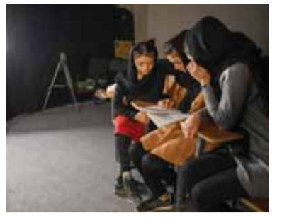
'We're not giving up': Radio station for Afghan women