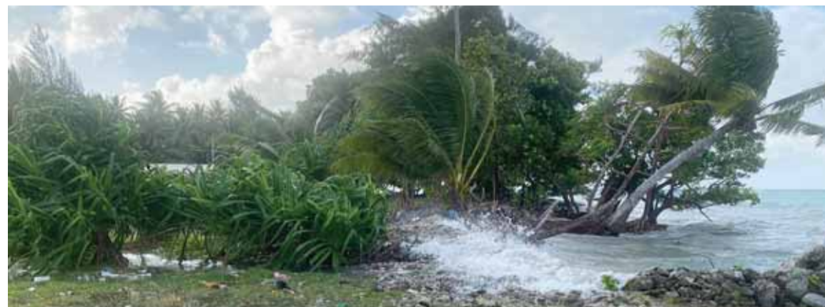
MAJURO, Marshall Islands: File photo shows high-tide flooding in the Marshall Islands capital Majuro. A swathe of Pacific island nations were cleaning up yesterday after storms and tidal surges caused widespread flooding, with rising seas blamed for the inundation in the climate-change affected region.

The pandemic has compounded its impacts, she said, as more and more people "are using drugs alone and often dying alone." "That tells us people are hiding their addiction from family and friends