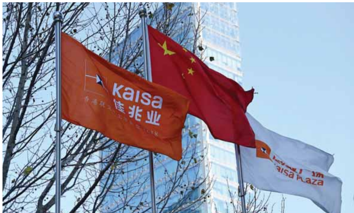
BEIJING: This file photo taken shows a flag of Chinese developer Kaisa Group fluttering next to a Chinese national flag outside the company's office building in Beijing.

After Evergrande said Friday it may not be able to meet its financial obligations, the government summoned the company's founder and announced several moves that have given the clearest picture yet of Beijing's plans to end the crisis. A new seven-strong "risk management committee" has been set up to manage the restructuring. Only two executives from the company are on the committee—others include officials from state entities.