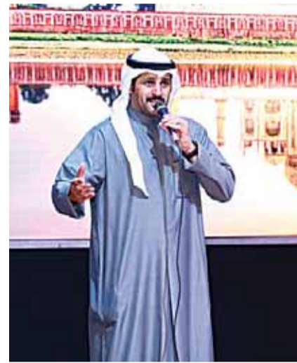
Renowned Kuwaiti singer Mubarak Al-Rashed performs.