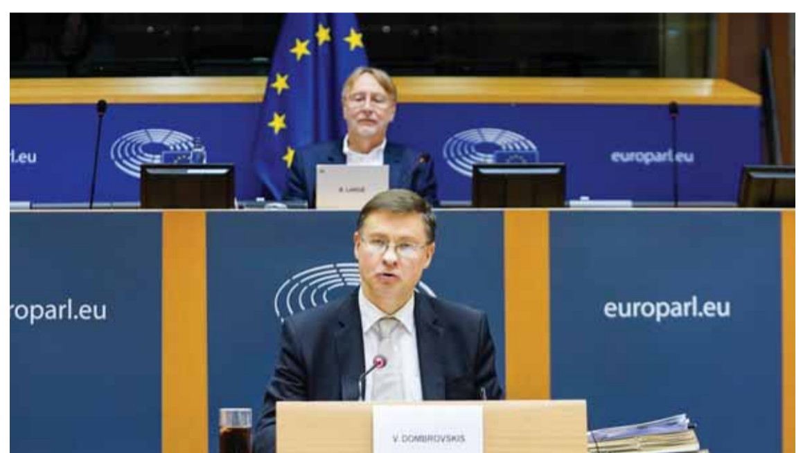
BRUSSELS: EU executive vice president Valdis Dombrovskis said "With this proposal we are sending a clear message that the EU will stand firm in defending its interests."

"The instrument is there to fend off any third country from pressuring the EU or its member states in a way that would seek to interfere in our domestic affairs in violation of customary international law," an EU official said. The commission's plan now goes to parliament and to the EU's member states, where some governments already have