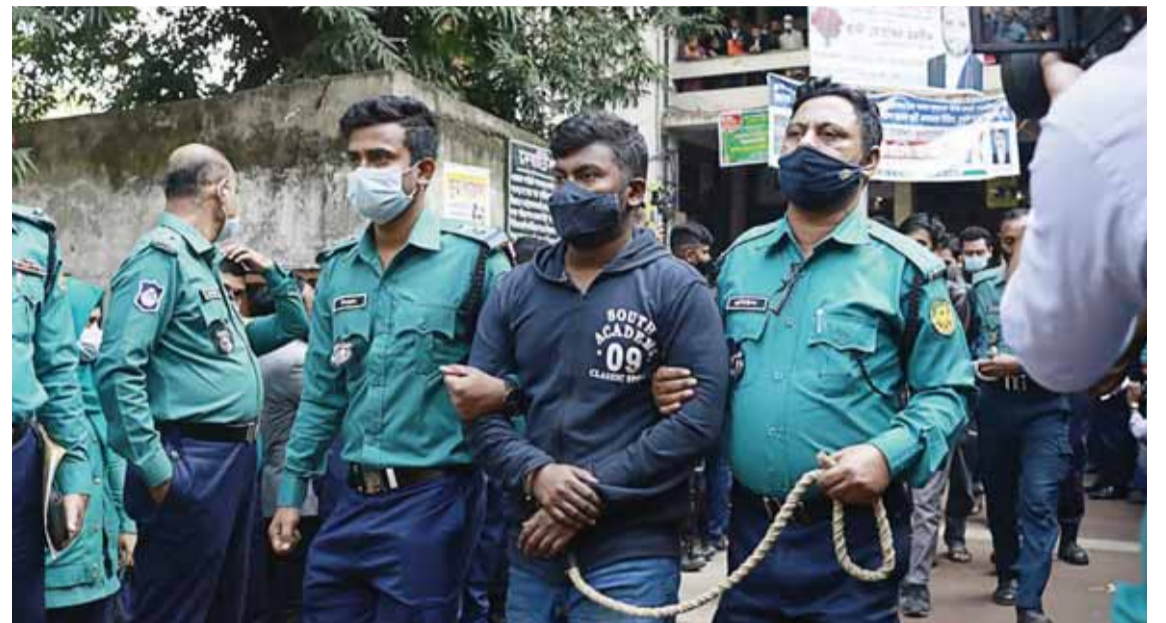
DHAKA: Police escort one of the 20 convicted university students, after their sentence to death for the brutal 2019 murder of a young man who criticised the government on social media, out of a court in Dhaka yesterday.

The BCL has earned notoriety in recent years after some of its members were accused of killing,