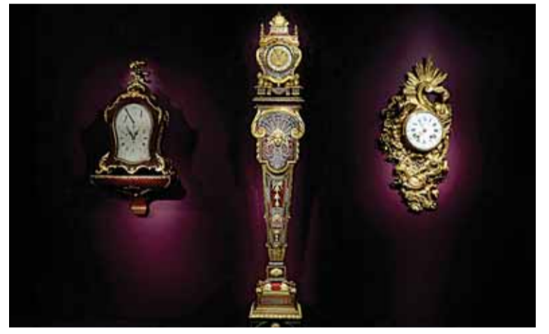
Items on display during a press preview for "Inspiring Walt Disney: The Animation of French Decorative Arts" at the Met in New York.

What was the inspiration for the talking teapots and singing candelabra that populate Walt Disney's movies? A new show in New York suggests they can be traced back to antiques and artwork that the animation master encountered in Paris as a young man. The Metropolitan Museum of Art exhibi-