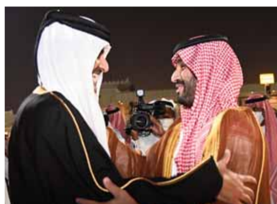
Saudi Crown Prince Mohammed bin Salman meets Qatari Amir Sheikh Tamim bin Hamad Al-Thani (left) and Abu Dhabi Crown Prince Mohammed bin Zayed Al-Nahyan (right) during his visits to the two countries.