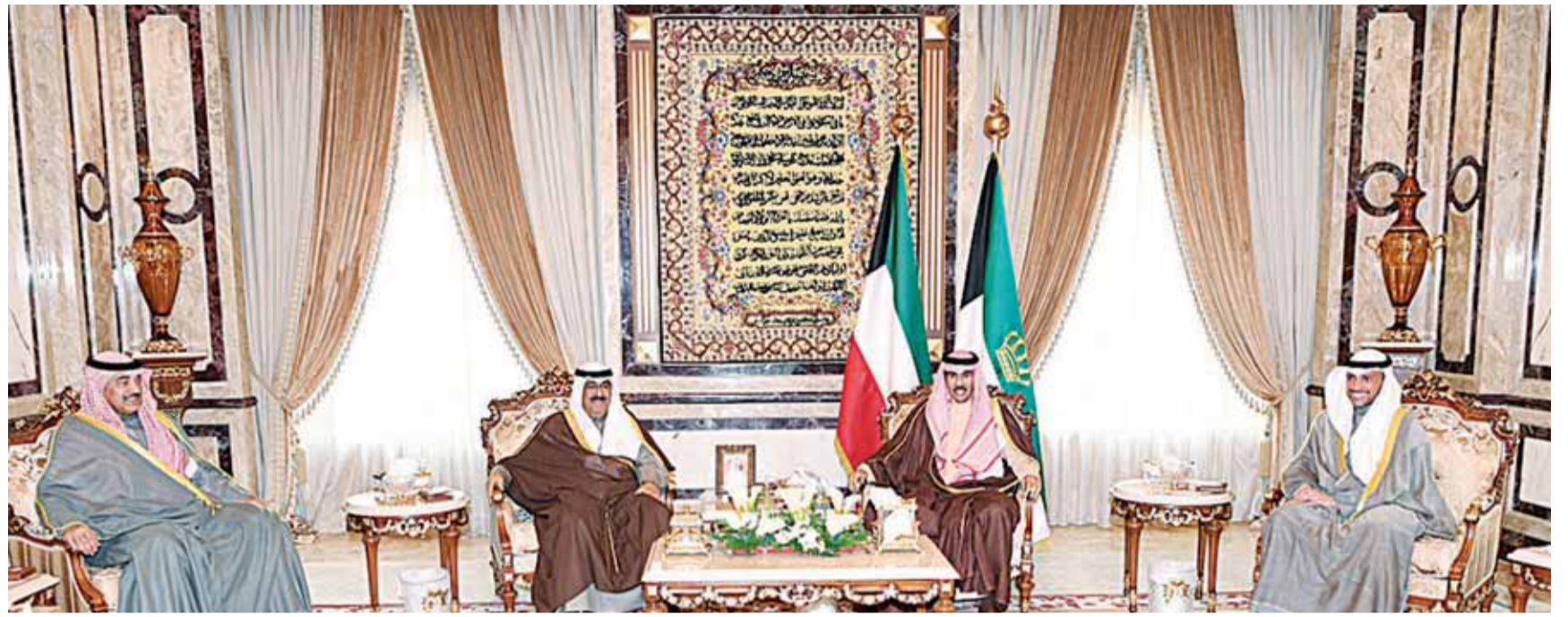
KUWAIT: His Highness the Amir Sheikh Nawaf Al-Ahmad Al-Jaber Al-Sabah received yesterday at Dar Al-Yamama, His Highness the Crown Prince Sheikh Mishal Al-Ahmad Al-Jaber Al-Sabah, His Highness the Amir also received National Assembly Speaker Marzouq Ali Al-Ghanem, as well as His Highness the Prime Minister Sheikh Sabah Al-Khaled Al-Hamad Al-Sabah.