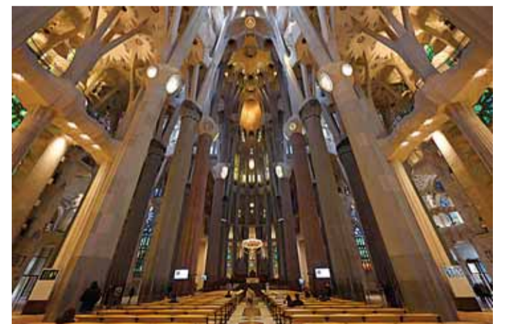
A general view of the Sagrada Familia basilica in Barcelona.