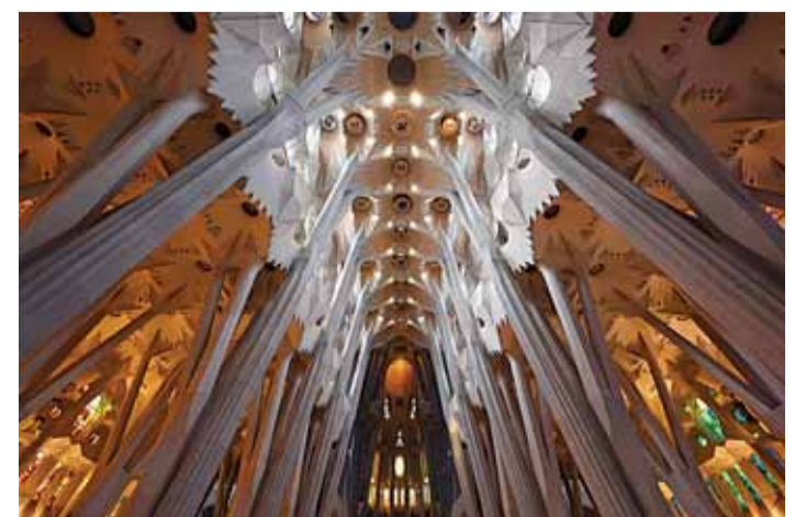
A general interior view of the Sagrada Familia basilica.