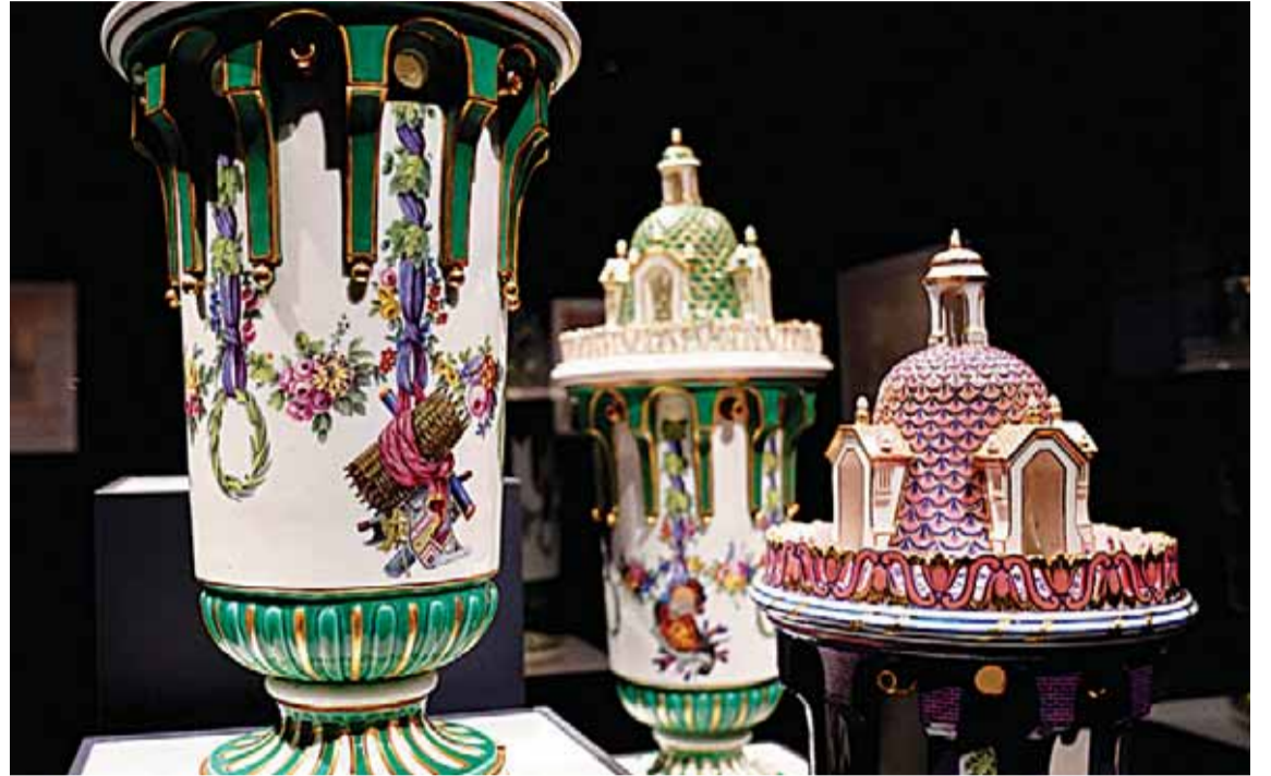
Items on display during a press preview for "Inspiring Walt Disney: The Animation of French Decorative Arts" at the Met in New York.