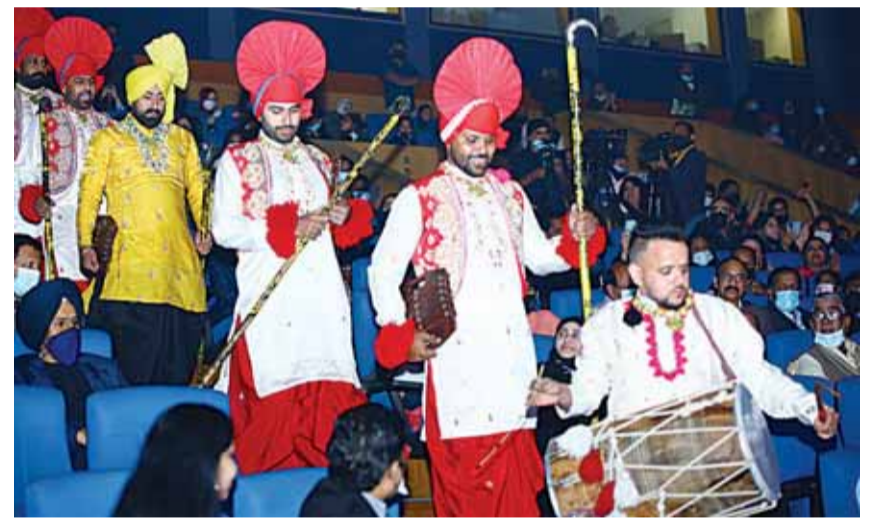
The traditional Punjabi 'Bhangra' dance by Dhol Beats Bhangra Boys.