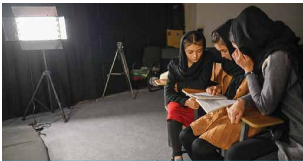
KABUL: This picture taken on November 28, 2021 shows students attending a class on-air at Radio Begum in Kabul. From Taliban-controlled Kabul, Radio Begum is broadcasting the voices of women that have been muted across Afghanistan.