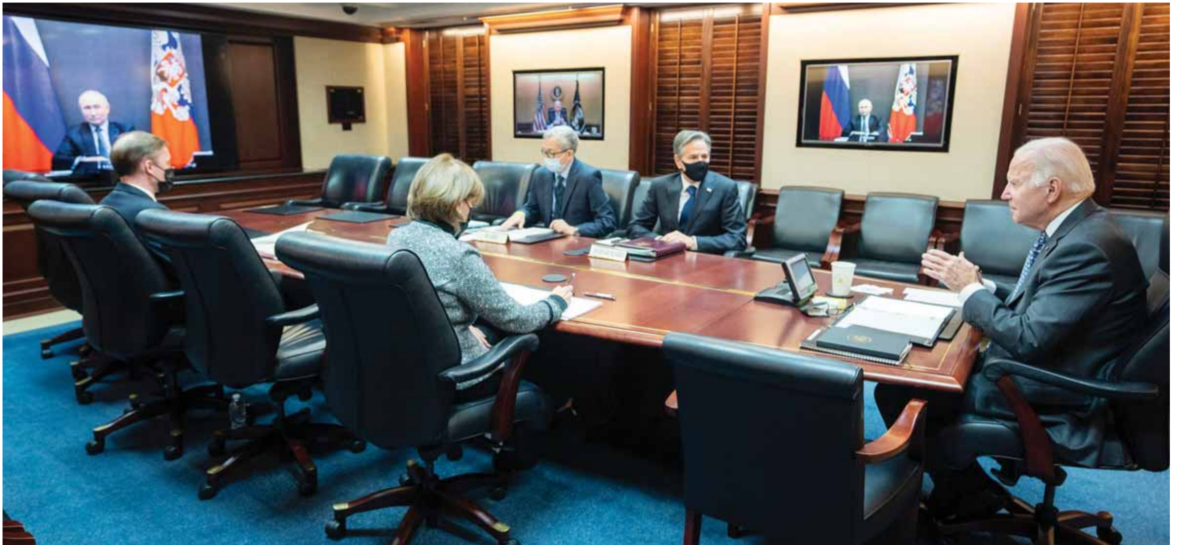
WASHINGTON: In this image released by The White House, US President Joe Biden (R), with Secretary of State Antony Blinken (2nd R) speaks with Russian President Vladimir Putin (on screen) from the White House in Washington.