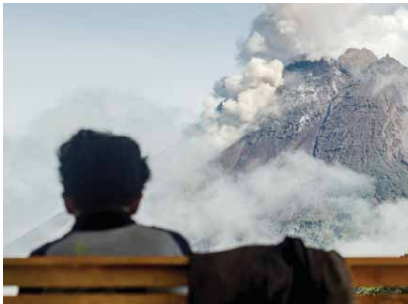
SLEMAN, Yogyakarta, Indonesia: A villager looks at Mount Merapi, Indonesia’s most active volcano, as seen from Sleman, on December 2, 2021. — AFP

Indonesia sits on the Pacific “Ring of Fire”, where the meeting of continental plates causes high volcanic and seismic activity. The Southeast Asian archipelago nation has nearly 130 active volcanoes. In late 2018, a volcano in the strait between Java and Sumatra islands erupted, causing an underwater landslide and tsunami which killed more than 400 people. — AFP