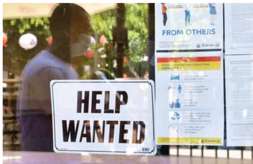
WASHINGTON: The United States added just 210,000 jobs last month, the government reported Friday, less than half the increase analysts were expecting in the latest headwind for President Joe Biden.

The economy remains short nearly four million jobs compared to where it was before the pandemic, but the data nonetheless contained signs of improvement. The number of unem-