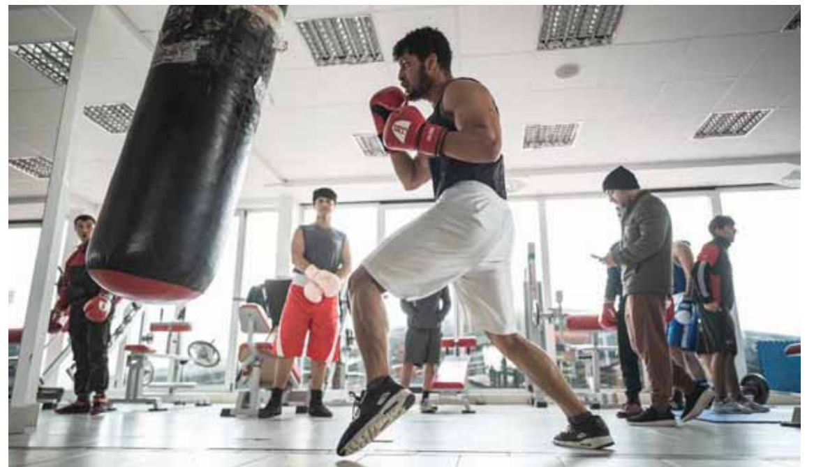
BELGRADE: Afghan boxers train in a gym in the outskirts of Belgrade.