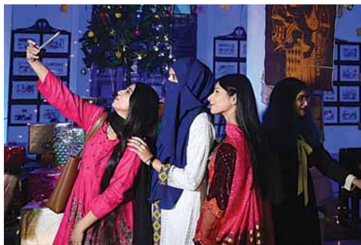
Visitors taking selfie pictures as they attend a Harry Potter festival.