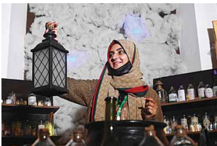
A visitor enjoying a Harry Potter festival at the Government College University (GCU).