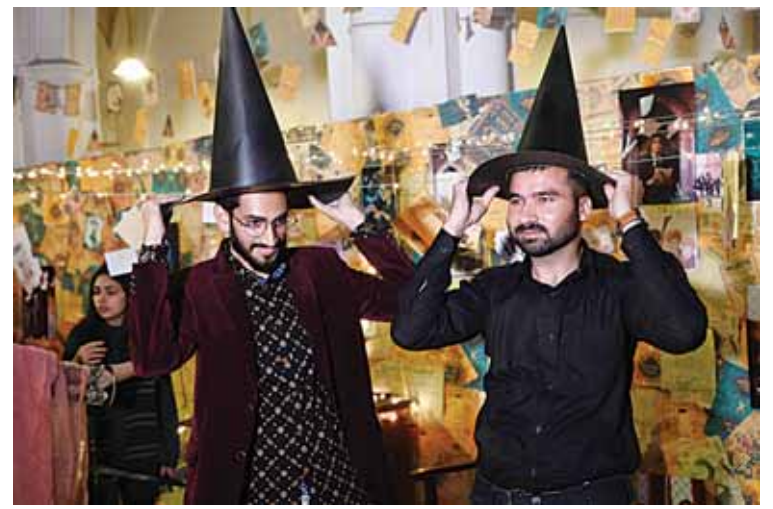
Visitors enjoying a Harry Potter festival at the Government College University (GCU) campus in Lahore.