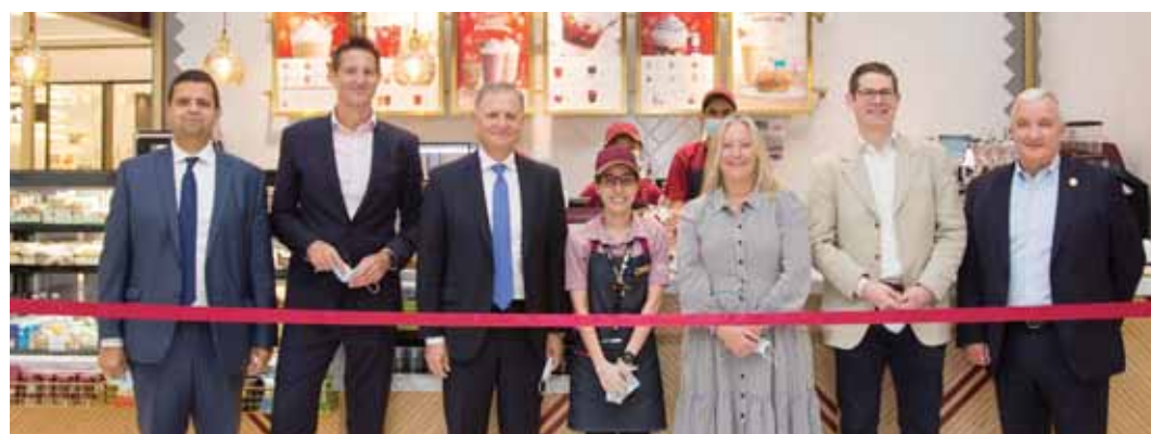
A group photo