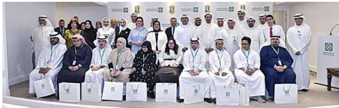
KUWAIT: Kuwait Finance House and Kuwait Society for the Handicapped in a group photo with the trainees.

KUWAIT: Kuwait Finance House (KFH) has honored the first batch of special needs students from the Kuwait Society for the Handicapped (KSH). The students participated in a training program as part of a partnership agreement, which is the first of its kind at the banking sector level to be signed between the bank and the society. The agreement comprises several initiatives and training programs allocated to students with special needs including field visits to KFH branches and departments.