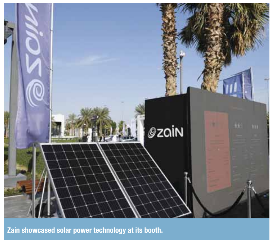
Zain showcased solar power technology at its booth.

The company is keen on aligning its actions with the recommendations of the Intergovernmental Panel on Climate Change (IPCC) report and with the goals of Paris Agreement, along with the recommendations of the Global Mobile Telecommunications Union (GSM), and through digital transformation initiatives, expanding the reach of the list of services as much as possible.