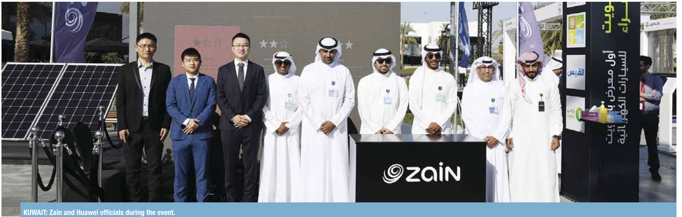
KUWAIT: Zain and Huawei officials during the event.

Company showcased latest solar power solutions in its booth