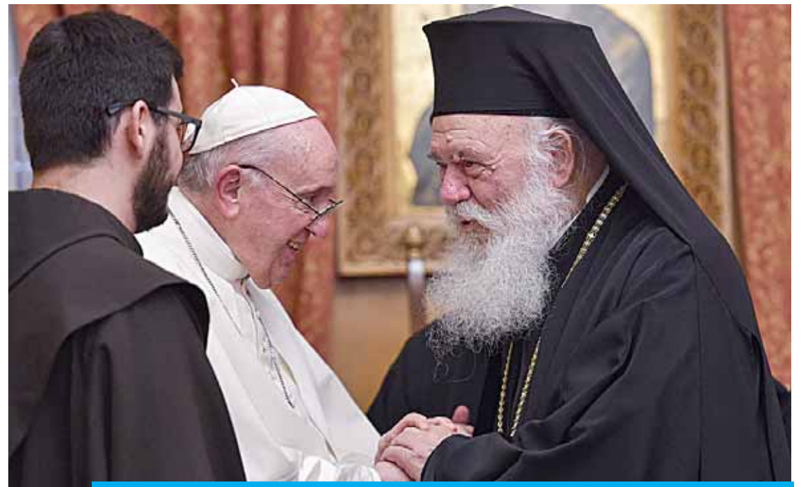
ATHENS, Attica: Pope Francis (2L) holds hands with Archbishop Ieronymos II of Athens and All Greece (R) during a meeting in the "Throne Room" of the Orthodox Archbishopric of Greece in Athens, yesterday.

“I ardently long to meet you all, not only Catholics, but all of you”