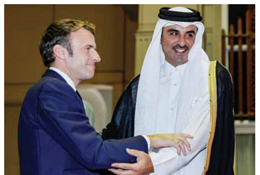
DOHA: Qatar's Amir Sheikh Tamim bin Hamad Al-Thani (R) receives French President Emmanuel Macron (L) at the Amiri Diwan in the capital Doha.

Speaking in Dubai, the first stop on his tour, Macron said he had not forgotten Khashoggi but it was impossible to engage with the region while ignoring the powerful Saudis. The United Arab Emirates signed a record 14-billion-euro ($15.8 billion) contract for 80 Rafale warplanes at the start of Macron's visit.