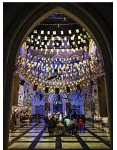
Visitors attending a Harry Potter festival at the Government College University (GCU).