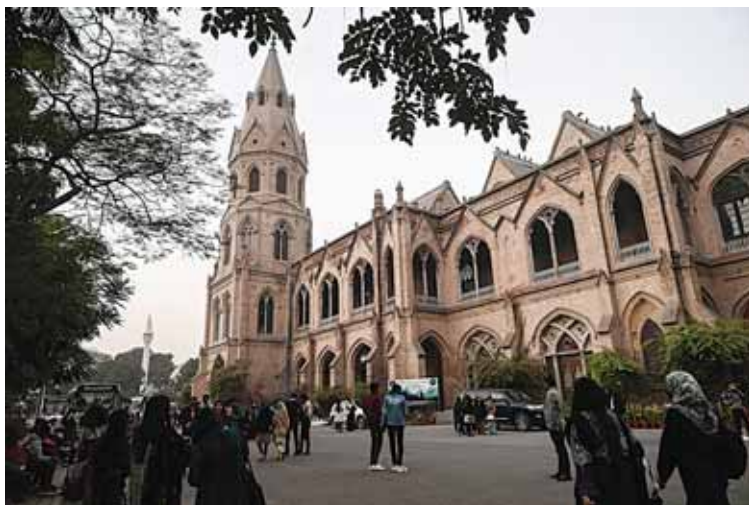
This picture shows visitors arriving to attend a Harry Potter festival at the Government College University (GCU) campus in Lahore.