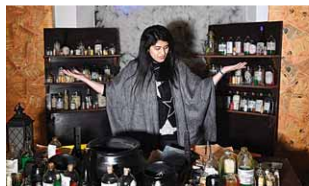
A visitor enjoying a Harry Potter festival.

The festival is also screening what is believed to be Pakistan's first fan-made Harry Potter film. Titled "The Last Follower and the Resurrection of Voldemort," the film was made and acted by students and comes with special effects, spells and a gripping storyline. "We really thought it would be a crazy idea to change the building, put some mountains around it, create some characters that can go