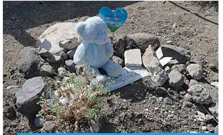
LAS PALMAS: Picture shows the grave of a Malian migrant toddler who died in March this year after arriving in Arguineguin in respiratory arrest on March 16, in San Lazaro cemetery in Las Palmas de Gran Canaria, on November 17, 2021.