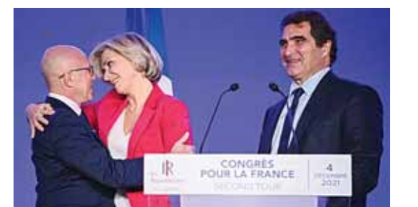
PARIS: Les Republicains (LR) right-wing party's head of the Ile-de-France region and candidate for the 2022 presidential election Valerie Pécresse (C) celebrates flanked by the party's President Christian Jacob (R) and second placed candidate Eric Ciotti (L) after won LR's primary in Paris yesterday.

Pécresse is betting that rightwing voters are ready for her brand of conservatism that focuses on economic rigour as much as law and order concerns. She has promised to "restore French pride" with a programme of budget cuts, immigration curbs, a defence of "family