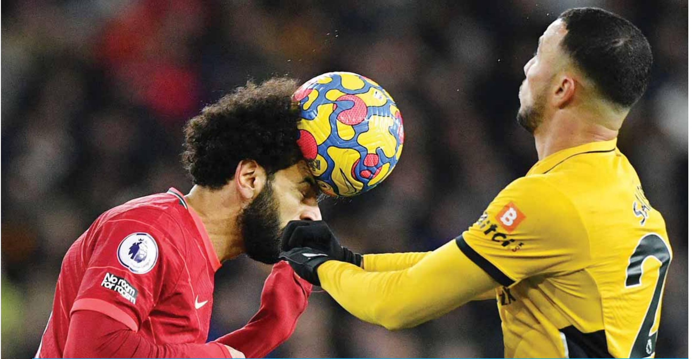
WOLVERHAMPTON: Liverpool's Egyptian midfielder Mohamed Salah (left) heads the ball during the English Premier League football match between Wolverhampton Wanderers and Liverpool at the Molineux stadium yesterday.