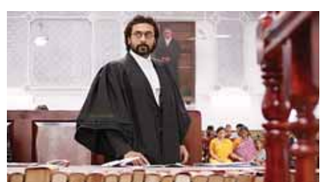
This undated handout photo shows Tamil film star Saravanan Sivakumar, also known as Suriya, during a scene in the Tamil-language legal drama 'Jai Bhim', at the Gokulam Film Studios in Chennai.