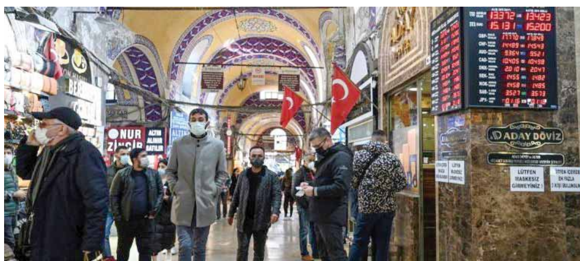
ANKARA: Turkey's annual inflation rate surged Friday above 20 percent.

The central bank responded that time around by sharply raising borrowing costs. But analysts believe that Erdogan is more determined this time around to keep rates down to push the annual growth rate to more than 10 percent—a target he