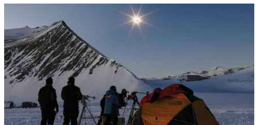
UNION GLACIER: Chilean and US scientists look at a solar eclipse from the Union Glacier in Antarctica yesterday.