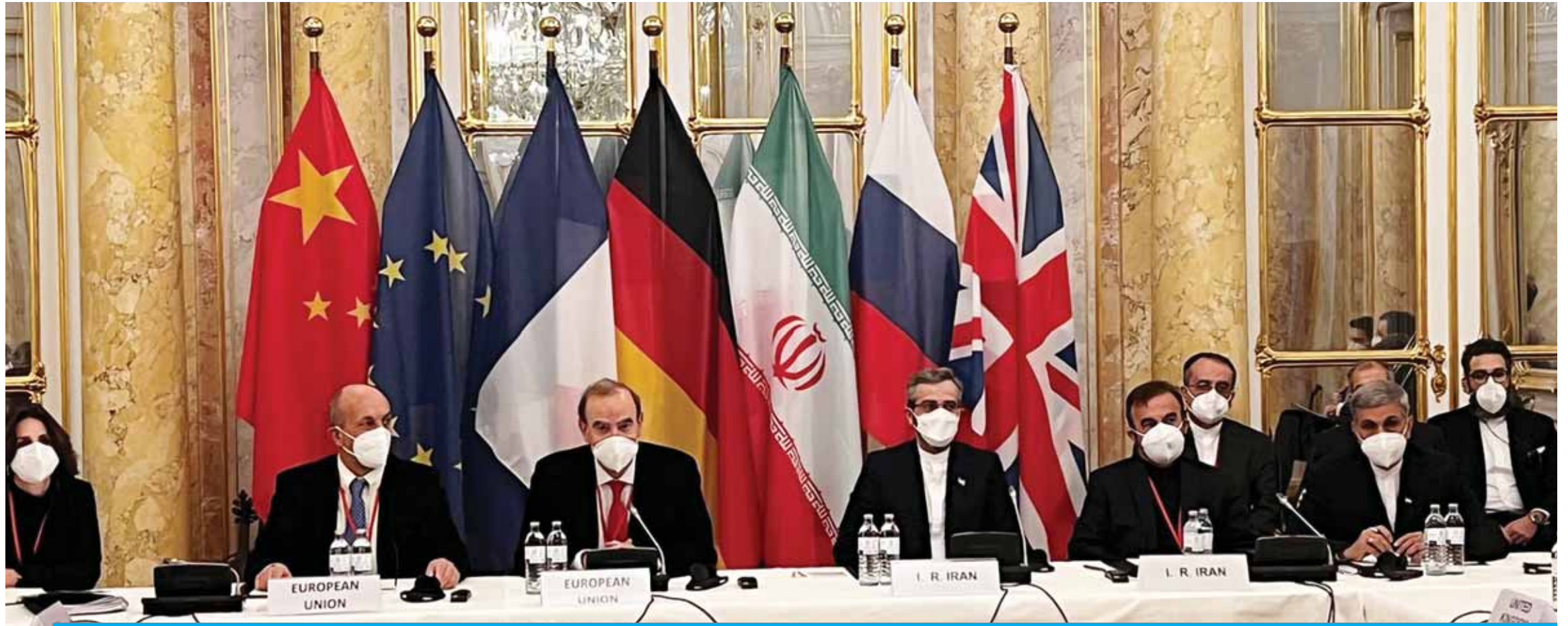
VIENNA: This handout photo taken and released on December 3, 2021 by the EU delegation in Vienna shows representatives from Iran (R) and the European Union (L) attending a meeting of the joint commission on negotiations aimed at reviving the Iran nuclear deal in Vienna, Austria.