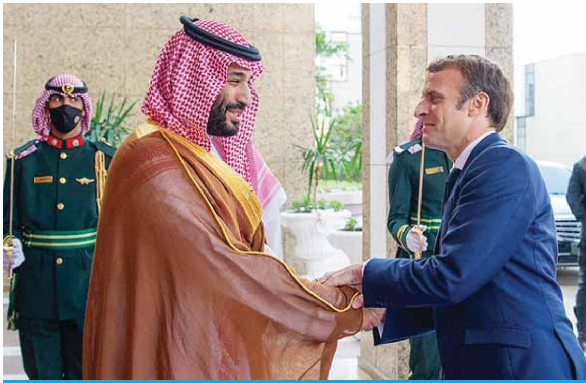
JEDDAH: Saudi Crown Prince Mohammed bin Salman (left) receives French President Emmanuel Macron in Saudi Arabia's Red Sea coastal city of Jeddah yesterday.

JEDDAH: French President Emmanuel Macron met Saudi Arabia's de facto ruler in Jeddah yesterday to discuss regional stability, in particular crisis-hit Lebanon. Macron landed in the kingdom's Red Sea city after visits to the United Arab Emirates and Qatar as part of a short Gulf tour. Crown Prince Mohammed bin Salman shook hands with Macron, who wore a face mask, welcoming him at the royal palace before talks and a lunch together.