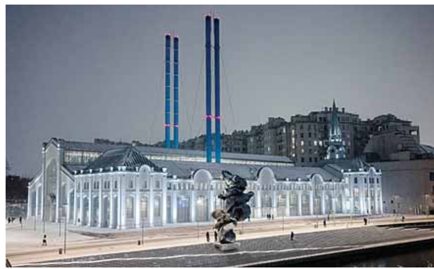
This picture shows the GES-2 contemporary arts center on the banks of the Moskva River in Moscow.