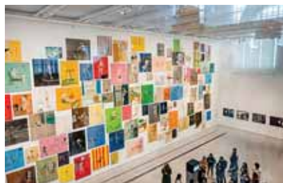
Visitors attend to the opening of GES-2 contemporary arts centre on the banks of the Moskva River in Moscow.

Across from the Kremlin, the century-old plant that used to supply the seat of Russian power with electricity has been transformed by a billionaire gas tycoon into a temple of contemporary art. Set to open Saturday, the GES-2 venue on the banks of the Moskva River winding through the Russian capital was designed by leading Italian architect Renzo Piano and promises to house the biggest international names and Russian stars.