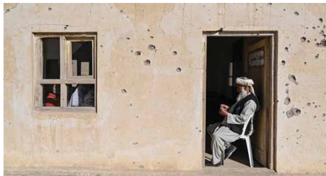
ARZO, Afghanistan: In this photograph taken on November 16, 2021, a teacher sits at the entrance of a classroom at a bullet riddled school in Arzo village on the outskirts of Ghazni.