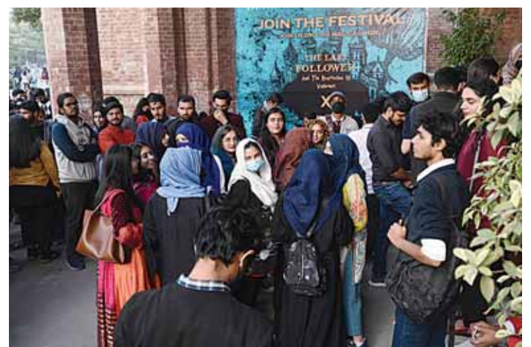
Visitors arriving to attend a Harry Potter festival.