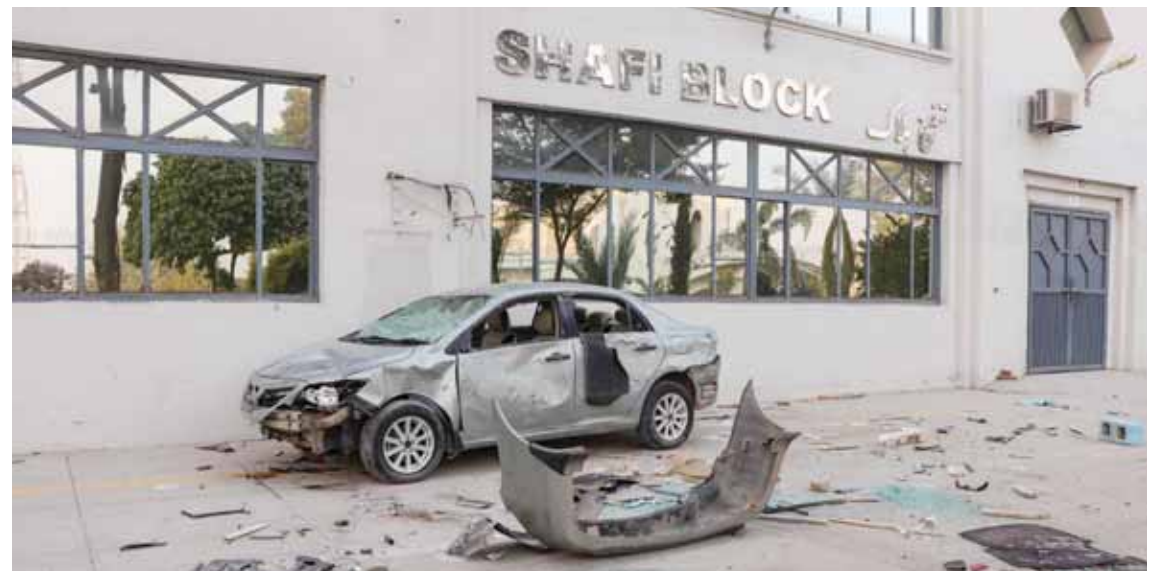
SIALKOT, Punjab Province: The charred remains of a damaged vehicle is kept near the premises of a factory in Sialkot after police confirmed that a Sri Lankan factory manager was beaten to death and set ablaze by mob, in an incident local media reported was linked to alleged blasphemy.

Almost all the political and religious parties condemned the incident including Pakistan’s Army Chief. President and Prime Minister of Sri Lanka Saturday expressed shock over the killing, asking