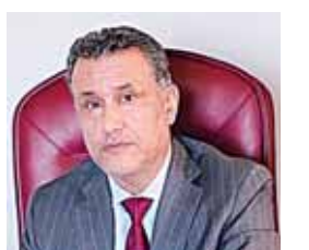
Kuwait's Permanent Representative to FAO Yousef Juhail

ciation that prompts Kuwait to continue its humanitarian role to serve the vulnerable and marginalized segments across the world. Kuwait, which chaired the Executive Board for the first time on January 1, 2016 until December 31, 2018, has been considered one of the outstanding countries that pays much attention to humanitarian activities of the WFP. —KUNA