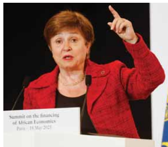
PARIS: International Monetary Fund (IMF) Managing Director Kristalina Georgieva speaks during a joint press conference at the end of the Summit on the Financing of African Economies in Paris.