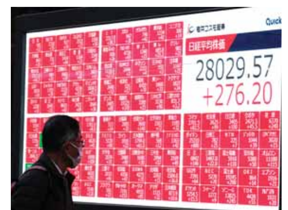
TOKYO: A pedestrian walks past an electronic quotation board displaying the closing share prices of the Tokyo Stock Exchange in Tokyo on Friday.

Bourses in Paris, Frankfurt and London all declined. Wall Street stocks also had a difficult day, with the tech-rich Nasdaq leading major indices lower. All three US indices finished with weekly losses in a period that also saw the Federal Reserve signal a plan to accelerate the withdrawal of its monetary stimulus and potentially hike rates sooner.