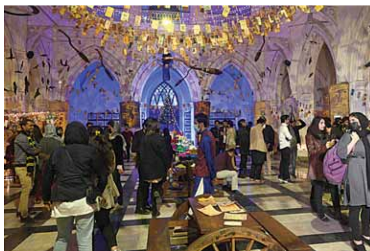
Visitors attending a Harry Potter festival at the Government College University (GCU) campus in Lahore.