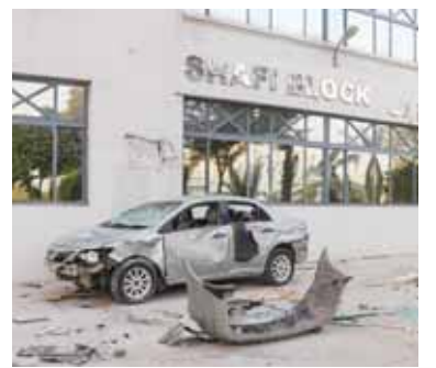
Dozens held after mob kills Lankan factory boss

Pope hits out at EU migration divisions at start of Greek visit