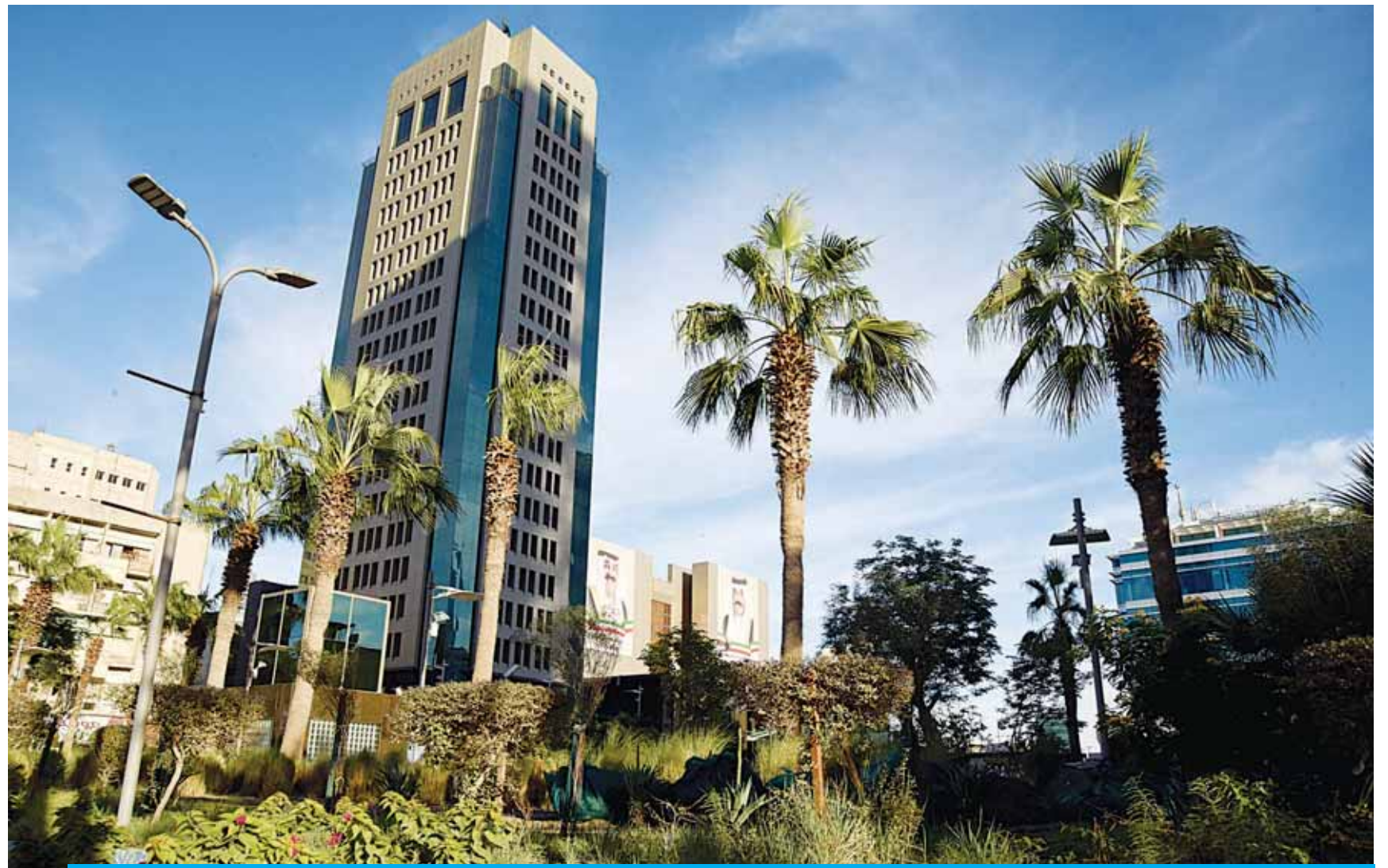
KUWAIT: This picture taken yesterday shows a general view from Kuwait City.