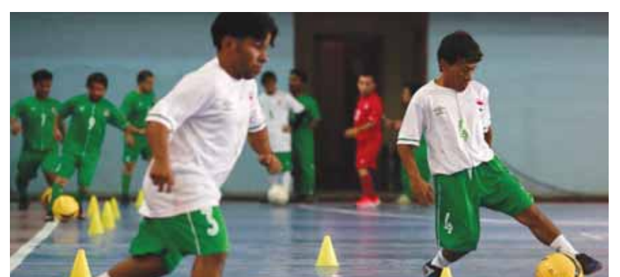
BAGHDAD: Members of the Iraqi football team for little people attend a training session at a fitness centre in the capital Baghdad in preparation for international competitions.