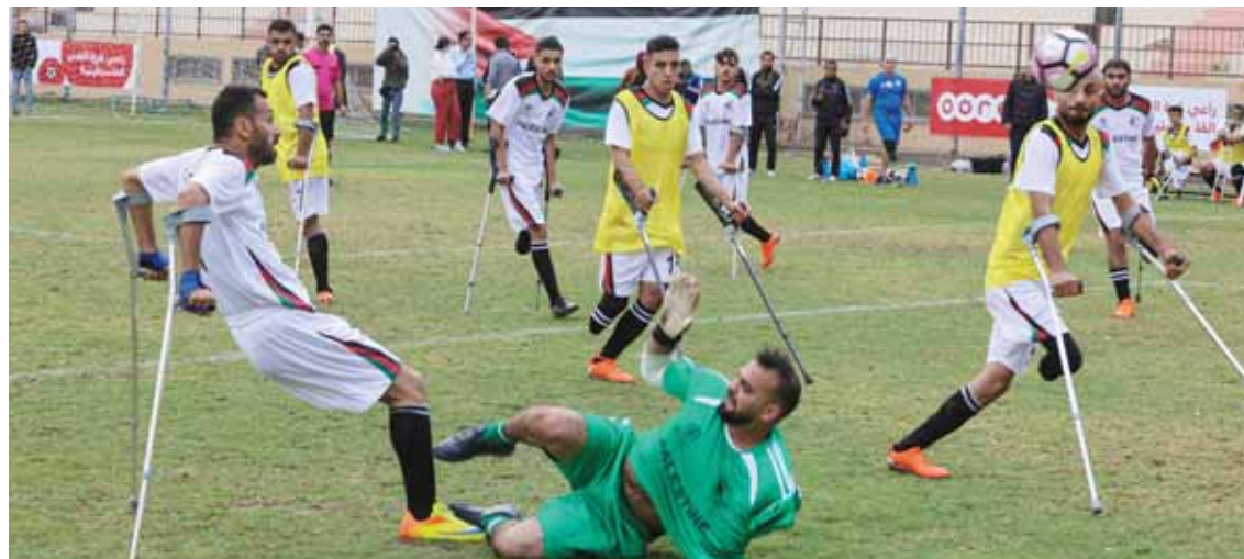
GAZA: Palestinian players with disabilities, part of a football team organized by the International Committee of the Red Cross (ICRC), take part in match in Gaza City on December 2, 2021.

"From the moment of injury, my life has not changed," he told AFP. "I continued with my ambi-