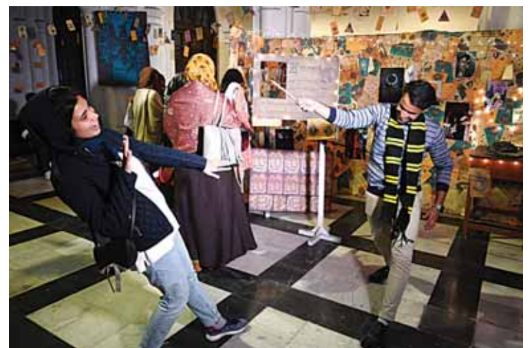
Visitors enjoying a Harry Potter festival.