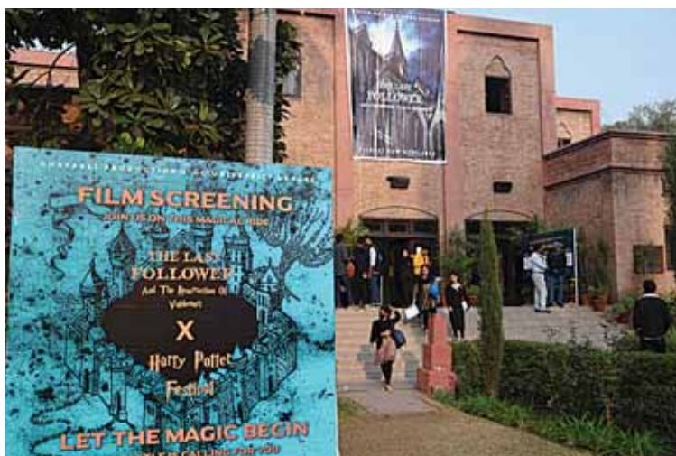
Visitors arriving to attend a Harry Potter festival.