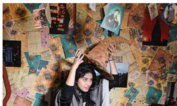
A visitor posing for pictures during a Harry Potter festival at the Government College University (GCU).