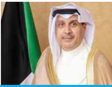
Kuwait's Defense Minister Sheikh Hamad Jaber Al-Ali Al-Sabah

KUWAIT: Kuwait's Deputy Prime Minister and Defense Minister Sheikh Hamad Jaber Al-Ali Al-Sabah received a phone call from the US Secretary of Defense Lloyd Austin. During the call, both sides discussed issues of joint interest, a host of topics regarding the regional and international arenas, according to a statement released by the Kuwaiti Ministry of Defense yesterday. Minister Sheikh Hamad, during the call, invited his US counterpart to visit Kuwait, underscoring depth of the bilateral relations between the two friendly countries and their mutual keenness on boosting these bonds. He thanked secretary Austin for the