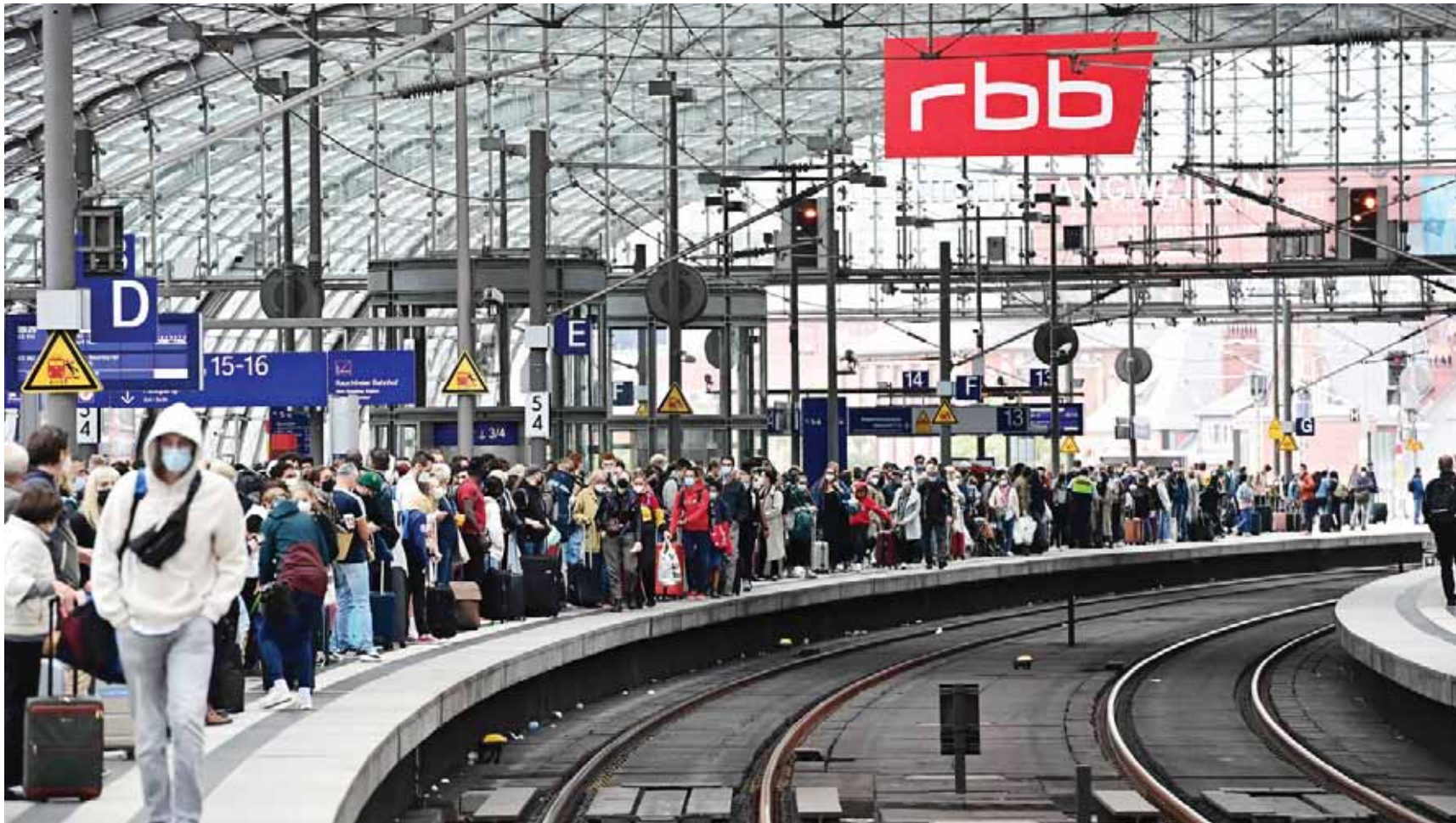
BERLIN: Commuters crowd on a platform at Berlin's main railway station during a wage strike by German train drivers in Berlin yesterday. A strike on German passenger rail began early yesterday, creating headaches for thousands of travellers and commuters, after the train drivers' union rejected a new offer to keep services going.