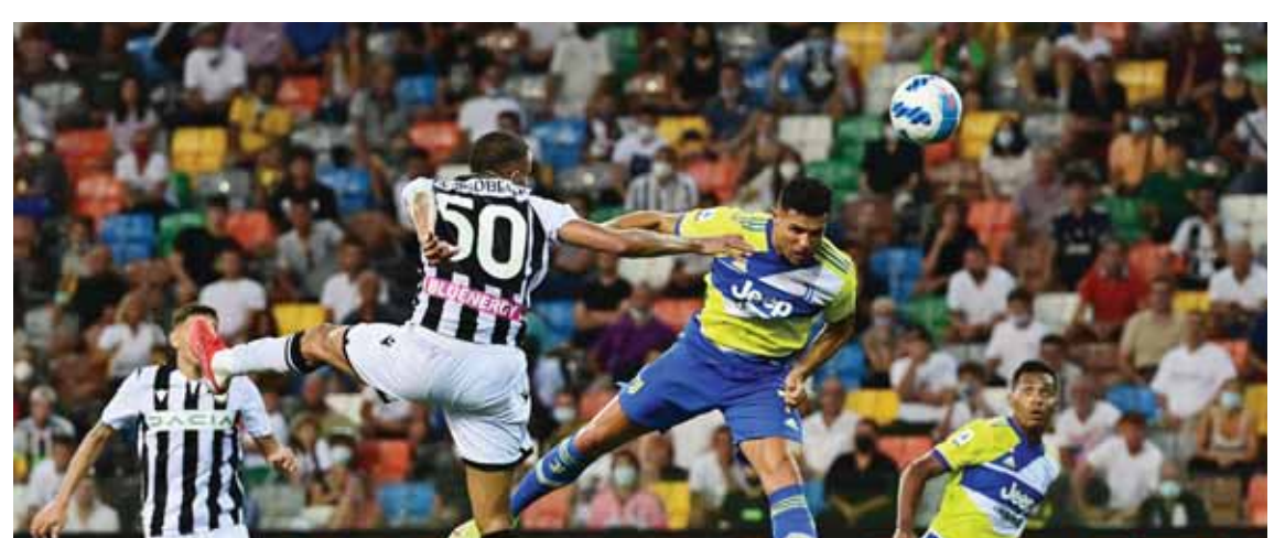
UDINE: Juventus' Portuguese forward Cristiano Ronaldo heads the ball during the Italian Serie A football match between Udinese and Juventus at the Dacia Arena Stadium in Udine, on Sunday.

Veretout made sure Mourinho got three points from