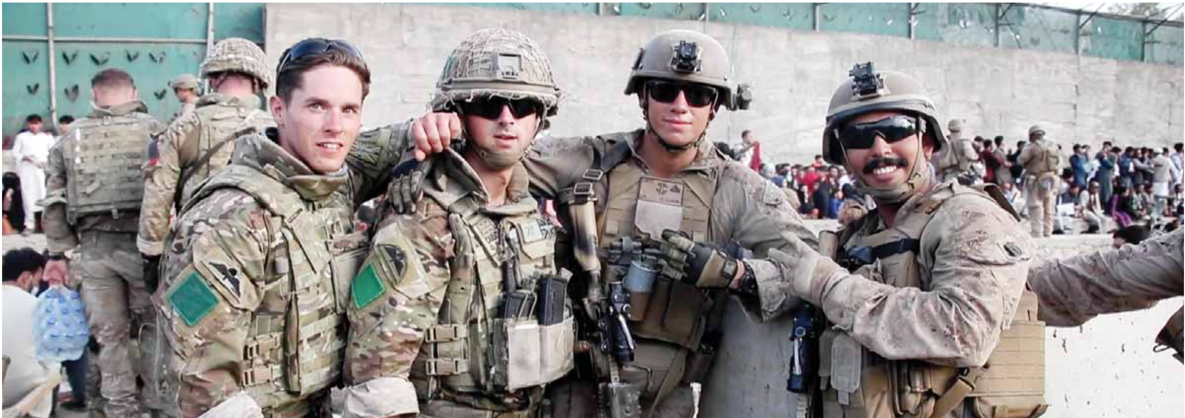
KABUL: A handout picture released by the British Ministry of Defense (MOD) shows members of the British (left) and US Armed Forces posing for a photograph while working at Kabul Airport Sunday.