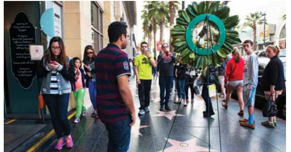
In this file photo flowers are placed on the Everly Brothers star to honor the memory of Phil Everly at Hollywood Walk Of Fame in Hollywood, California.