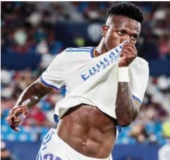
VALENCIA: Real Madrid's Brazilian forward Vinicius Junior celebrates scoring his team's second goal during the Spanish League football match against Levante at the Ciutat de Valencia stadium in Valencia on Sunday.

The Argentinian international midfielder was willing to help out in defense and assisted on his compatriot's goal, with a pass very like the one with which he set up Angel di Maria for Argentina's winner in the Copa America final against Brazil in July. De Paul lofted the ball over the visiting defense and into the path of the sprinting Correa.