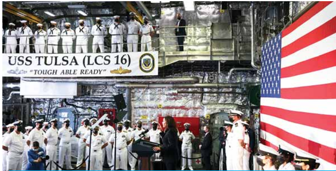
SINGAPORE: US Vice President Kamala Harris speaks to troops as she visits the USS Tulsa in Singapore yesterday.

But US officials insist the trip was planned long before the Afghan crisis and is focused on Washington’s broader strategic goals in Asia. Southeast Asia is seen as critically important at a time China is challenging US political sway and naval dominance in the region.