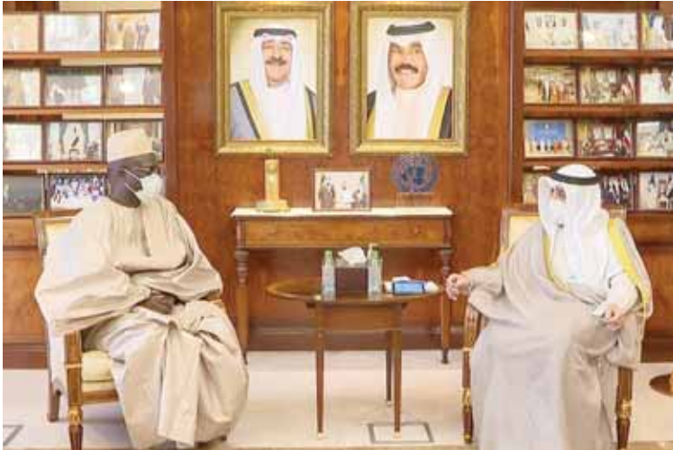
KUWAIT: Foreign Minister Sheikh Dr Ahmad Nasser Al-Mohammad Al-Sabah meets Ambassador of Senegal to Kuwait.