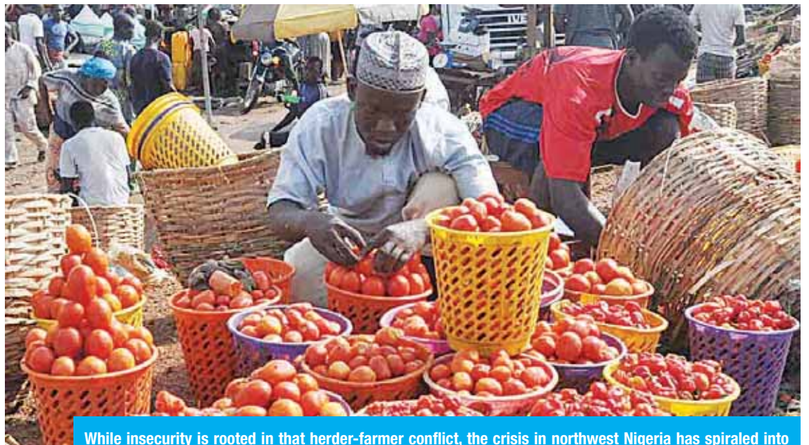
While insecurity is rooted in that herder-farmer conflict, the crisis in northwest Nigeria has spiraled into broader criminality with mass abductions for ransom, cattle theft and banditry.

"Without adequate security, there can't be farming to produce food for our people." In May, the UN Food and Agriculture Organization (FAO) warned at least 9.2 million Nigerians face a crisis or worse levels of food insecurity this year because of the country's conflicts.