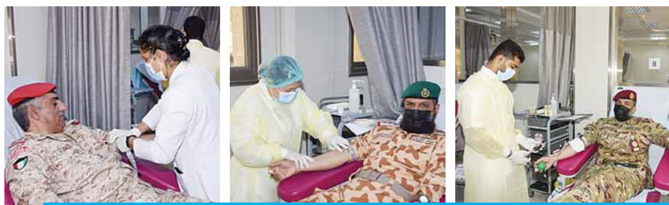
KUWAIT: Kuwait's Ministry of Defense launched a three-day blood donation drive yesterday in cooperation with the Ministry of Health. —KUNA