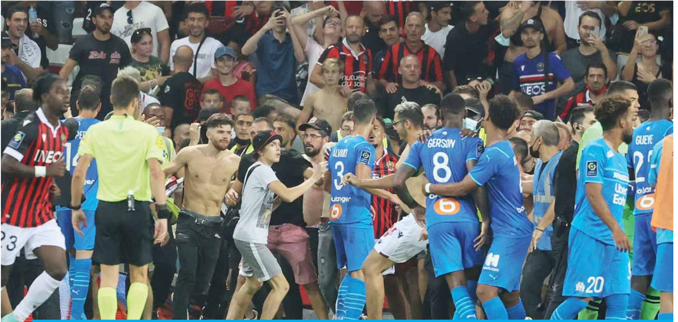
NICE: Fans invade the pitch during the French L1 football match between OGC Nice and Olympique de Marseille (OM) at the Allianz Riviera stadium in Nice, southern France on Sunday.

PARIS: Local authorities in Nice have opened an investigation into the ugly incidents which led to the abandonment of Sunday's Ligue 1 match between the home side and Marseille, while politicians in France called for punishments to be meted out to those responsible.