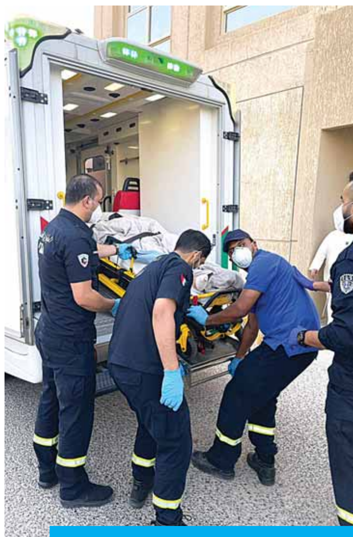
KUWAIT: Medical personnel admit the Lebanese patients at Al-Babtain Center for Burns shortly after their arrival from Lebanon.