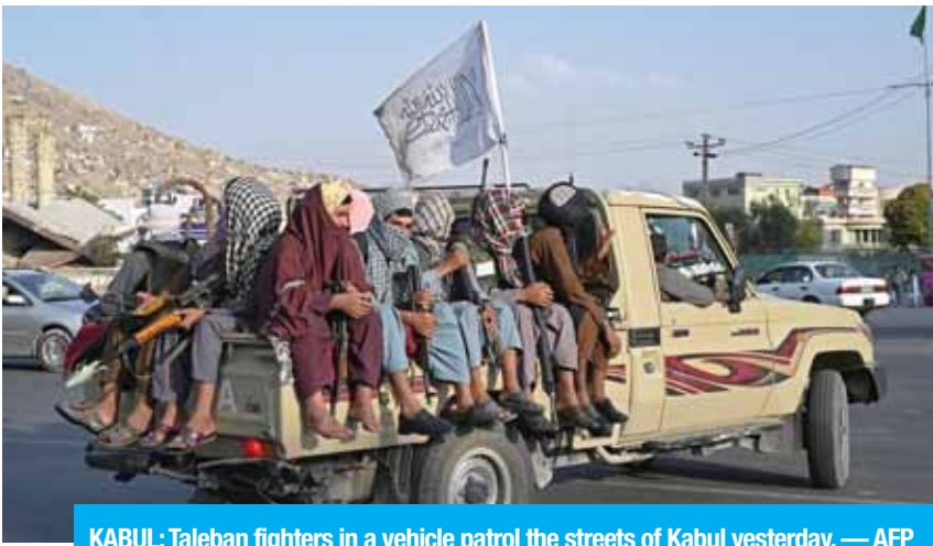
KABUL: Taleban fighters in a vehicle patrol the streets of Kabul yesterday.