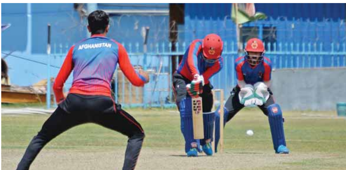
KABUL: Afghanistan's national cricket team players attend a training session at the Kabul International Cricket Ground in Kabul on Saturday, ahead of their one-day series against Pakistan, scheduled to take place in Sri Lanka in two weeks.