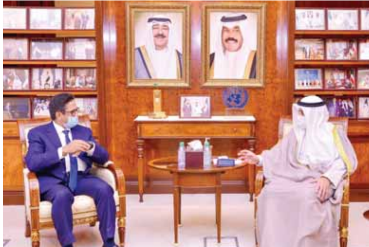
Foreign Minister Sheikh Dr Ahmad Nasser Al-Mohammad Al-Sabah meets Ambassador of Mauritania to Kuwait.