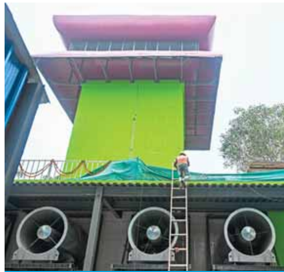
NEW DELHI: A worker climbs up a ladder at the 25-metre (82-foot) high smog tower, built to purify the air during pollution season, in New Delhi yesterday.

The city-state also has good relations with Beijing, and its leaders have warned the US against taking too tough a line towards China. Today, Harris will give a speech laying out Washington’s vision for the region and meet with business leaders to discuss supply chain issues, particularly a microchip shortage that has hit the auto industry. She departs for Hanoi today evening.