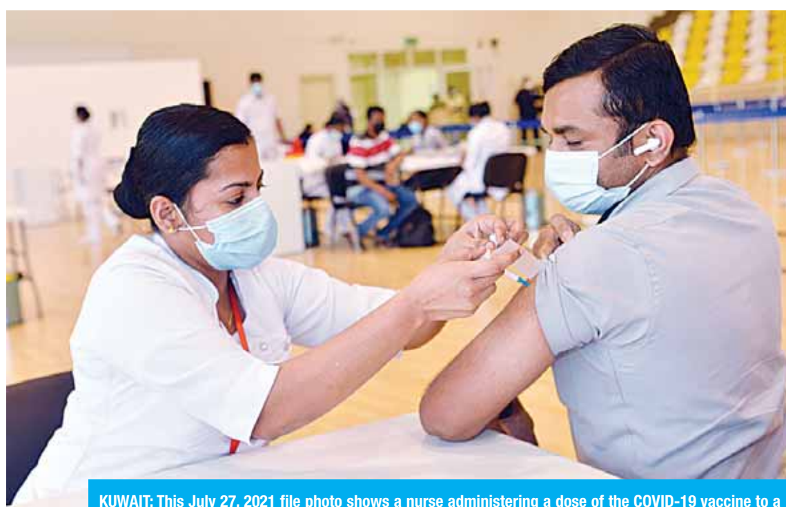
KUWAIT: This July 27, 2021 file photo shows a nurse administering a dose of the COVID-19 vaccine to a man at a vaccination center in Jleeb Al-Shuyoukh in Kuwait.

Kuwait's daily COVID-19 cases continued to drop as the country announced on Sunday registering 167 new cases in the previous 24 hours, in addition to one death - raising total cases and deaths to 408,245 and 2,404 respectively. The tests to infection ratio registered on Sunday was 1.69 percent as 9,878 swab tests were taken during the same period. The number of people hospitalized with the virus