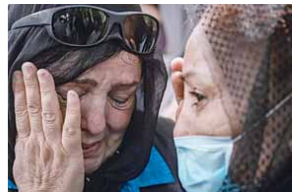
NEW DELHI: Afghans residing in India take part in a demonstration outside the UN Refugee Agency (UNHCR) office in New Delhi yesterday to protest against the Taliban's military takeover of Afghanistan.

Some of the worst destruction was in hard-to-reach rural areas, so the Haitian authorities have been using a United Nations helicopter and eight US aircraft to deliver aid. Aid delivery in hard-hit Les Cayes, Haiti's third-largest city, was being organized largely by inexperienced private groups or individuals, and fights have broken out amid those waiting for help. "We don't want to discourage the good Samaritans," Chandler said, but he urged people to communicate with his office so it