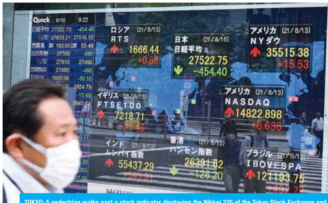
TOKYO: A pedestrian walks past a stock indicator displaying the Nikkei 225 of the Tokyo Stock Exchange and other world stock markets in Tokyo on August 16, 2021.

liftoff in 2023 and not before, said Esty Dwek of Natixis Investment Managers.