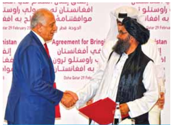
DOHA: In this file photo taken on February 29, 2020, US Special Representative for Afghanistan Reconciliation Zalmay Khalilzad (left) and Taliban co-founder Mullah Abdul Ghani Baradar shake hands after signing a peace agreement during a ceremony in the Qatari capital Doha.

In 2018 China built a much larger 60-metre smog tower in the polluted city of Xian, but the experiment has not spread to other cities so far.