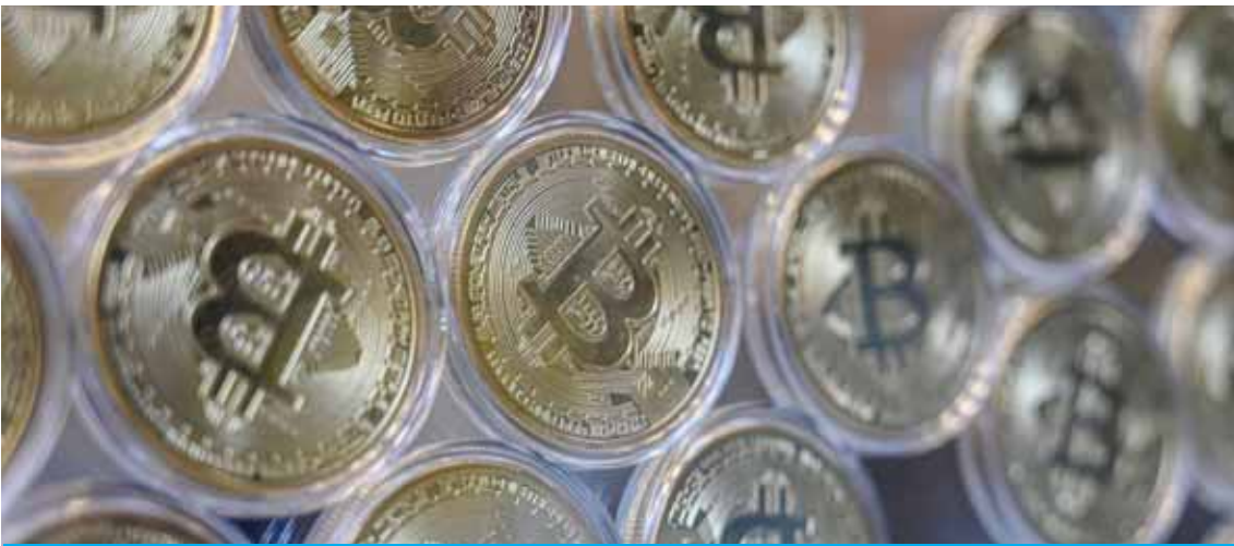
ISTANBUL: File photo shows a physical imitation of a Bitcoin at a cryptocurrency "Bitcoin Change" shop in Istanbul. Bitcoin broke back above $50,000 yesterday for the first time in three months.

They will be available both via the PayPal app and its website, with the expansion set to start this week and be available to all eligible customers within the next few weeks. In April, PayPal-owned mobile payments service Venmo began letting users in the US buy, hold or sell cryptocurrency using its app.