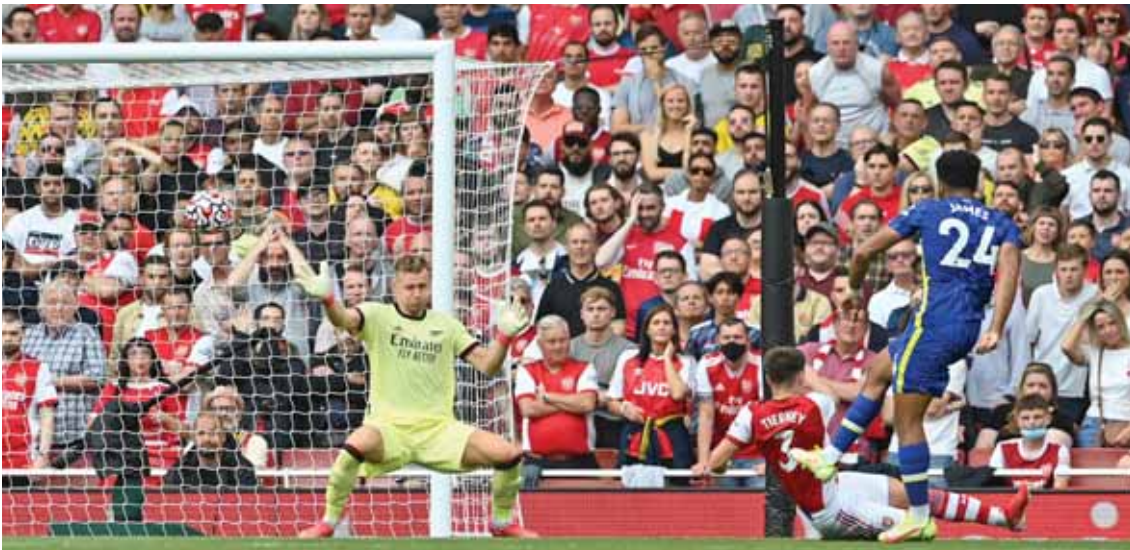
LONDON: Chelsea's English defender Reece James (right) shoots to score his team's second goal past Arsenal's German goalkeeper Bernd Leno (left) during the English Premier League football match between Arsenal and Chelsea at the Emirates Stadium in London on Sunday.

Former striker Ian Wright shook his head in bemusement at the latest display against Chelsea —