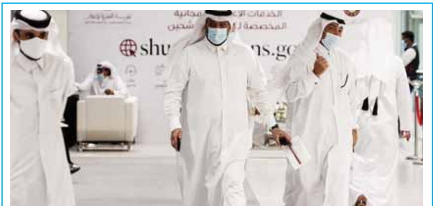
DOHA: Candidates leave after registering to run in the country's upcoming election to the Shura Council in Doha Sunday.