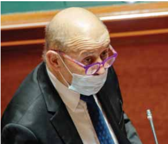
Jean-Yves Le Drian

ABU DHABI: French Foreign Minister Jean-Yves Le Drian was due in the UAE yesterday to see for himself the massive airlift underway from Afghanistan using the Gulf nation as a staging post. France is seeking to evacuate more than 1,000 Afghans who are fleeing the country following the Taliban’s lightning takeover a week ago, one of a number of nations scrambling to evacuate vulnerable individuals. Le Drian and colleagues were due to visit the Al-Dhafra base—some 30 kilometers (18 miles) from Abu Dhabi—where the French airforce has been conducting round the clock operations in support of the evacuations. Since August 15, “nearly 100 French residents, 40 residents of partner nations, and more than 1,000 (at-risk) Afghans” have been transported to France via the Emirates, Le Drian’s delegation said in a statement. A flight with 250 French and Afghans aboard left