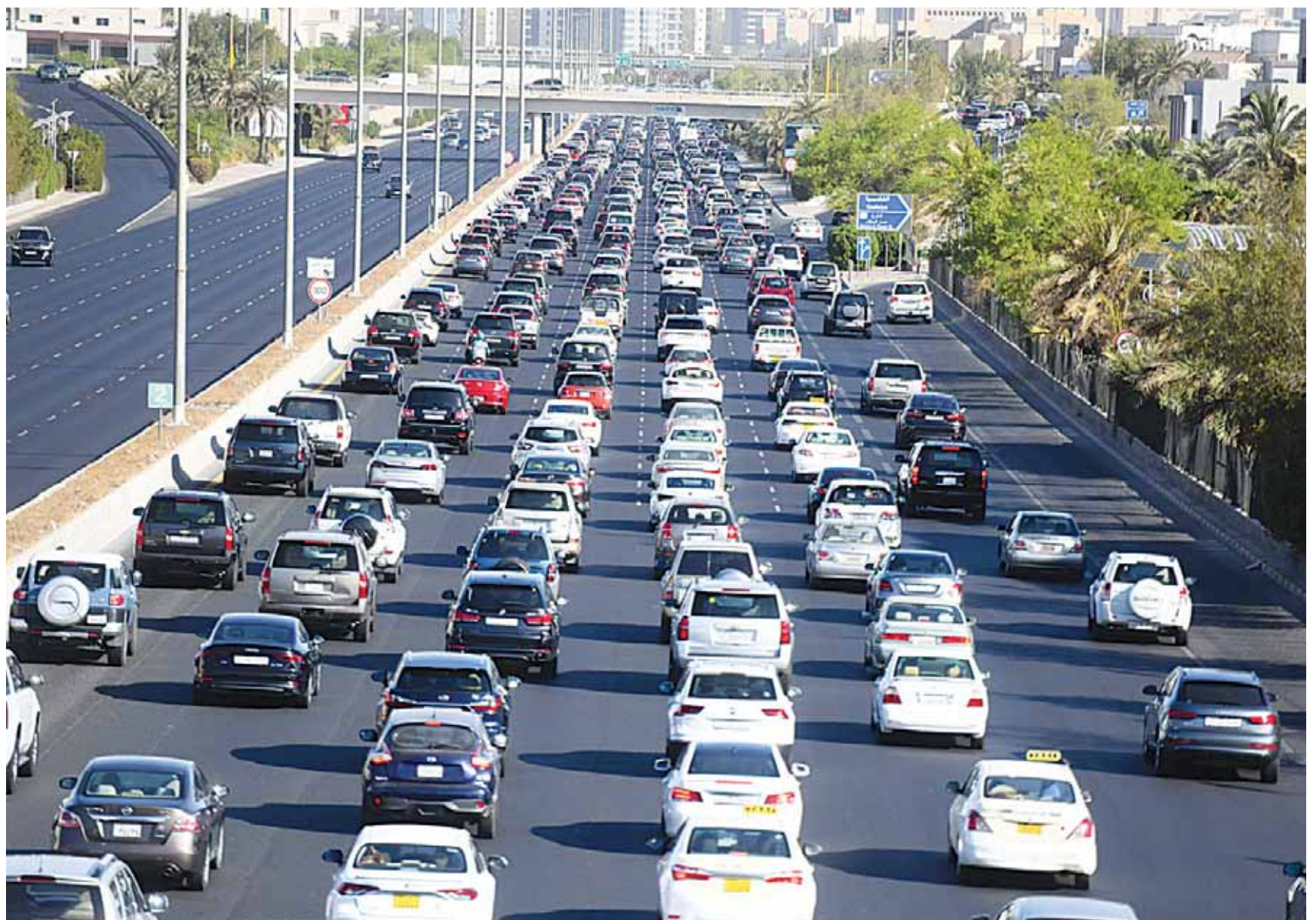
KUWAIT: This photo taken on August 15, 2021 shows a crowded road in Kuwait City, Kuwait. Heavy traffic returned to most main streets around Kuwait after state departments resumed work at full capacity earlier this month, while traffic authorities have said that they have launched coordination to plan for the return to school on October 3.