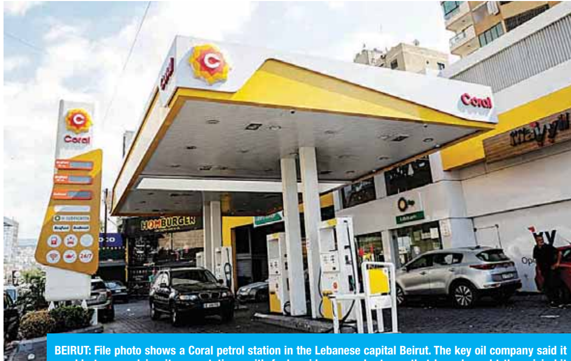
BEIRUT: File photo shows a Coral petrol station in the Lebanese capital Beirut. The key oil company said it would stop supplying its gas stations with fuel amid severe shortages that have brought the crisis-hit country to a halt. —AFP

Majzoub said that with international assistance, the ministry has provided donations of textbooks and stationery for public school students, as well as solar panels for 122 learning facilities. —AFP