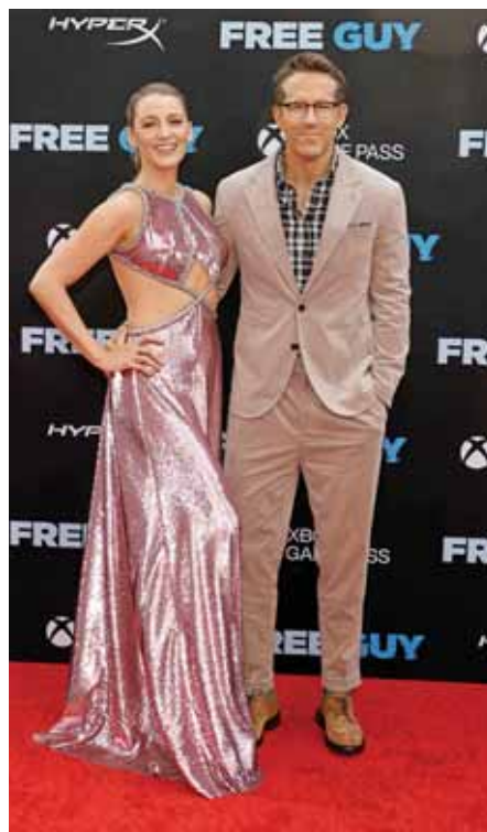
In this file photo Blake Lively and Ryan Reynolds attend the 'Free Guy' New York Premiere at AMC Lincoln Square Theater in New York City.

Twentieth Century's sci-fi comedy "Free Guy" slipped but did not trip on Sunday as it clung to the top spot in North American movie theaters with an estimated take of $18.8 million, industry watcher Exhibitor Relations reported. The film, its release delayed a year by the COVID-19 pandemic, is a lighthearted yarn