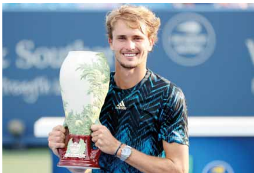
MASON: Alexander Zverev of Germany poses with the winner's trophy after defeating Andrey Rublev of Russia during the final of the Western and Southern Open at Lindner Family Tennis Center on Sunday in Mason, Ohio.

Although she doesn't leave Cincinnati with a trophy, women's runner-up Teichmann departs after a