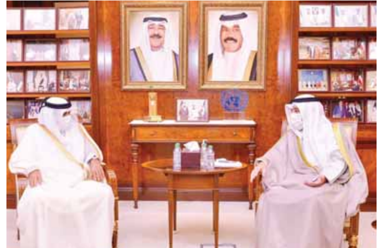
Foreign Minister Sheikh Dr Ahmad Nasser Al-Mohammad Al-Sabah meets Ambassador of Qatar to Kuwait.

KUWAIT: Minister of Foreign Affairs and Minister of State for Cabinet Affairs Sheikh Dr Ahmad Nasser Al-Mohammad Al-Sabah received yesterday at the Foreign Ministry Headquarter copies of credentials of the new ambassadors of Senegal, Mauritania and Qatar. The Minister wished the new diplomats success in their missions, and further prosperity to Kuwait's bilateral ties with their nations. — KUNA