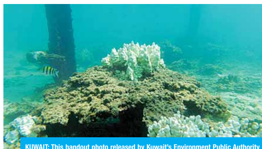
KUWAIT: This handout photo released by Kuwait's Environment Public Authority yesterday shows bleaching on coral reefs near the Qaruh Island. —KUNA

Meanwhile, the EPA yesterday denied online reports claiming the coastal regions have witnessed death of large numbers of fish. There was a countable number of fish deaths at some coastal regions over the past few days, EPA said in a statement, adding that the death of fish could not be classified as serious unless the number of dead fish exceeds 100,000. The fish death is a global phenomenon that recurs annually, it said, affirming that fish die due to waters' high temperature and irresponsible acts by sea-goers. —KUNA