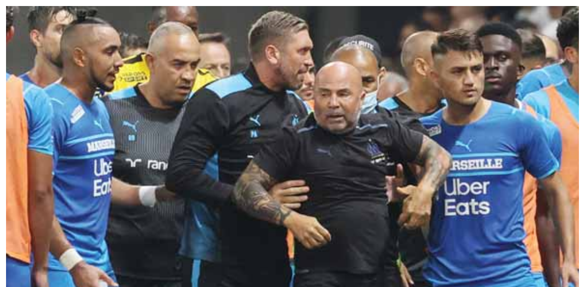
Marseille's French midfielder Dimitri Payet (right) speaks as Marseille's Argentine head coach Jorge Sampaoli (center) is steered by a colleague during the match.

The incidents are a huge blow for the image of Ligue 1, less than two weeks after Lionel Messi moved to France to sign for Paris Saint-Germain. It is also a major blow for Nice, a club with big ambi-