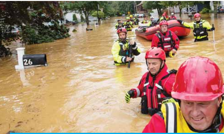
HELMETTA, US: Members of the New Market Volunteer Fire Company perform a secondary search during an evacuation effort following a flash flood as Tropical Storm Henri makes landfall in Helmetta, New Jersey, Sunday.

WASHINGTON: Devastating floods after record rainfall in the southern US state of Tennessee have left at least 21 people dead and at least 20 more missing, local officials said Sunday in what they warned was a preliminary toll. Tennessee was hit Saturday by what meteorologists called historic storms and flooding, dumping as much as 17 inches (38 centimeters) of rain. Rural roads, state highways, bridges and hundreds of homes were washed out and widespread power outages affected thousands of people. However, tropical storm Henri was downgraded to a tropical depression late Sunday after slamming into Rhode Island on the US east coast, knocking out power to thousands of Americans, uprooting trees, and bringing record rainfall. In Humpreys County, about 90 minutes from country music hub Nashville, the downpour on Saturday broke a 24-hour rainfall record for Tennessee, the National Weather Service said. Tennessee Governor Bill Lee described "picture of loss and heartache" in Waverly, a hard-hit town of around 4,500 where 20 of the victims