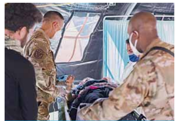
RAMSTEIN, Germany: In this image courtesy of the US Air Force, Airmen assigned to the 86th Medical Group provide post labor care to an Afghan mother who gave birth aboard a US Air Force C-17 Globemaster III.

calls its new "strategic compass", a framework to provide the 27 member states, acting together, to wield more diplomatic and military muscle and develop more of what France's President Emmanuel Macron calls "strategic autonomy". As events unfolded in Kabul, the president of the European Council, Charles Michel, who hosts EU leaders' summits, tweeted: "The situation in Afghanistan is not a success story for the international community.