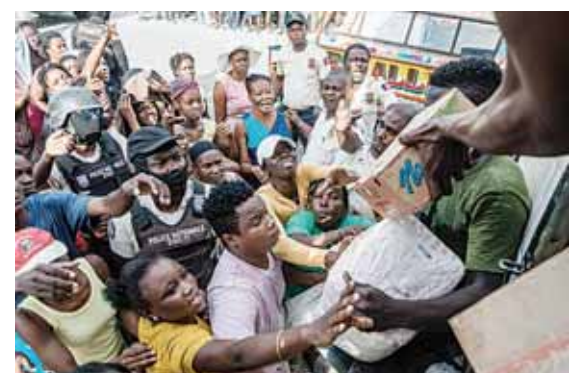
LES CAYES, Haiti: In this file photo police officers monitor the crowd as earthquake victims receive supplies during the distribution of food and water at the "4 Chemins" crossroads in Les Cayes, Haiti.

could help organize the most efficient delivery of aid to those in greatest need.