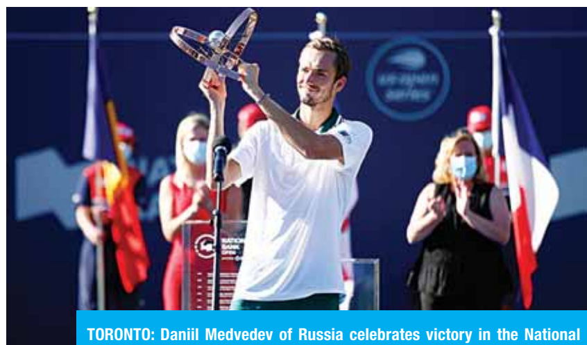
TORONTO: Daniil Medvedev of Russia celebrates victory in the National Bank Open singles final against Reilly Opelka of the United States at Aviva Centre on Sunday in Toronto, Ontario, Canada.

Medvedev said he went into the match with a plan to combat