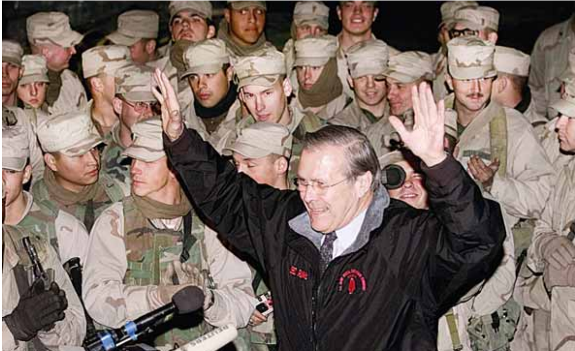
(Left) This file photo taken on Dec 23, 2001 shows Afghan anti-Taleban fighters flashing the victory sign as they leave the Tora Bora mountain area to make their way to their base. (Right) This file photo taken on Dec 16, 2001 shows US Defense Secretary Donald Rumsfeld throwing up his arms as he concludes his town hall meeting with US troops at Bagram airfield after he met Afghanistan's new leaders to discuss the country's future.