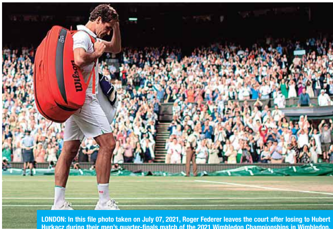
LONDON: In this file photo taken on July 07, 2021, Roger Federer leaves the court after losing to Hubert Hurkacz during their men's quarter-finals match of the 2021 Wimbledon Championships in Wimbledon, southwest London.

The 35-year-old Spaniard suffered a foot injury in his semi-final loss to Djokovic at the French Open in June. The Spaniard skipped Wimbledon and the Olympics and played just one match in Washington earlier this month before withdrawing