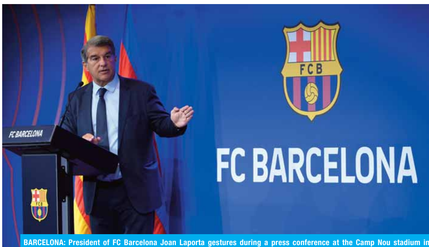
BARCELONA: President of FC Barcelona Joan Laporta gestures during a press conference at the Camp Nou stadium in Barcelona yesterday.

ments from UEFA, including a five percent cut in their European revenue for one season, after backing down and apologizing for their “mistake” in joining the project, widely condemned as a crude land grab.