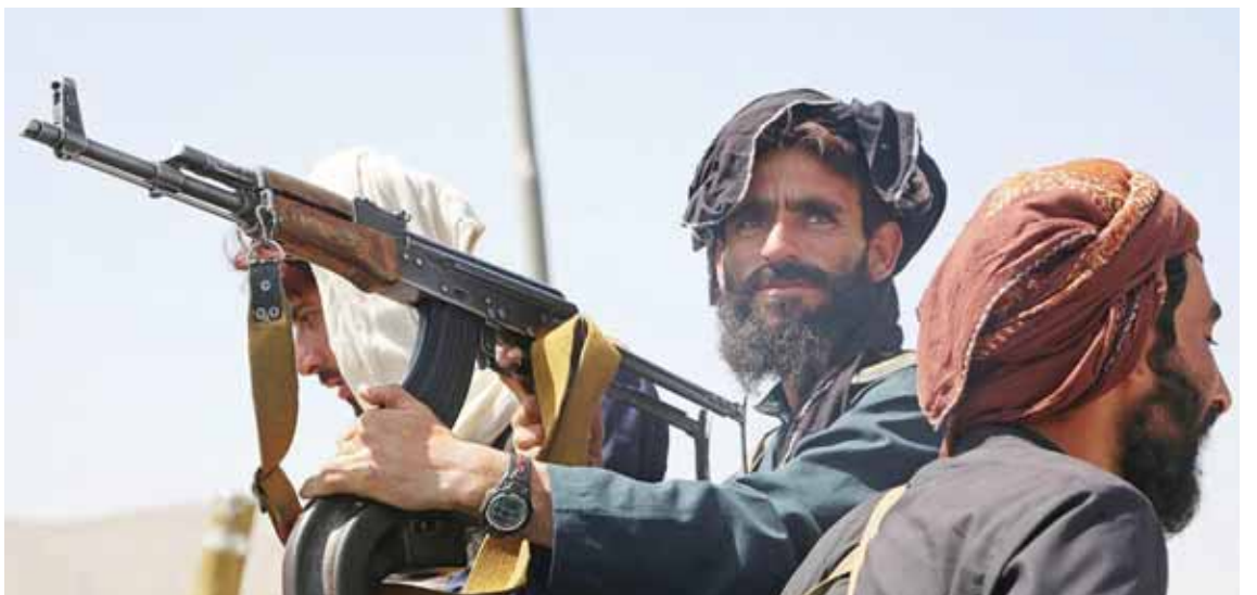
KABUL: Taleban fighters stand guard in a vehicle along the roadside in the capital yesterday.

The US State Department said American troops had secured the perimeter of the airport as they