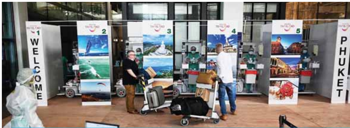
PHUKET: International travelers wait for COVID-19 swab tests as part of the 'Phuket Sandbox' quarantine-free tourism scheme for vaccinated visitors to the Thai resort destination, at Phuket International Airport in Phuket.

But COVID-19 cases there have started to climb. Restrictions were enacted last month on Phuket's businesses — shuttering pubs, boxing studios and karaoke lounges — while domestic travellers have been barred from entering the island.