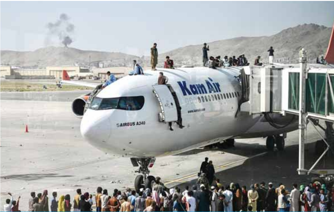
KABUL: (Left) Taleban fighters patrol the streets of the capital yesterday. (Right) People climb atop a plane as they try to flee at Kabul airport yesterday.

KABUL: Victorious Taleban fighters patrolled Kabul yesterday after a stunningly swift end to Afghanistan’s 20-year war, as thousands of people mobbed the city’s airport trying to flee the group’s feared hardline brand of Islamist rule. President Ashraf Ghani fled out of the country on Sunday night as the insurgents encircled the capital, capping a military victory that saw them capture all cities in just 10 days. “The Taleban have won with the judgement of their swords and guns, and are now responsible for the honor, property and self-preservation of their countrymen,”