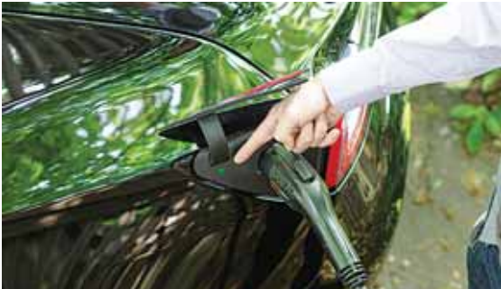
MONTCLAIR, US: In this file photo a man charges his Tesla vehicle in his backyard in Montclair, New Jersey. US safety officials opened a preliminary investigation into Tesla's Autopilot after identifying 11 crashes involving the driver assistance system, officials said yesterday.

not included in NHTSA’s list of 11 crashes. Those incidents involved cases “in which various Tesla models crashed where first responders were active, including some that crashed directly into the vehicles of first responders,” the spokesperson said. “NHTSA reminds the public that no commercially available motor vehicles today are capable of driving themselves,” the spokesperson said. “Certain advanced driving assistance features can promote safety by helping drivers avoid crashes and mitigate the severity of crashes that occur, but as with all technologies and equipment on motor vehicles, drivers must use them correctly and responsibly.” Tesla shares fell 3.4 percent to $693 in early trading.