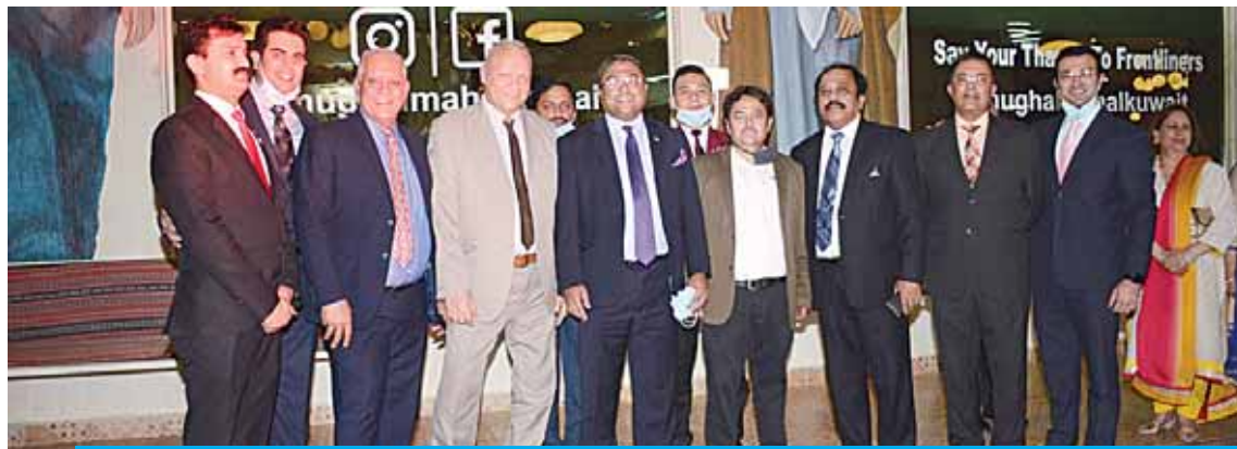
KUWAIT: A group picture taken during the event.