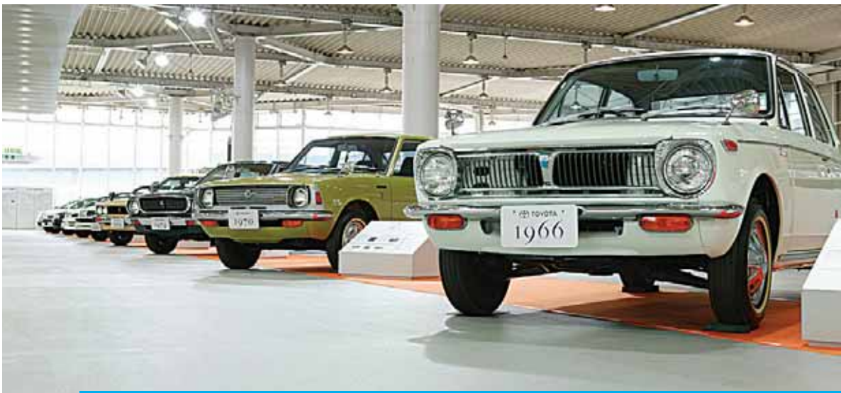
Toyota Corolla generations

Iconic model is recognized as the best-selling car of all time and continues to bring peace of mind and the joy of motoring to drivers around the world