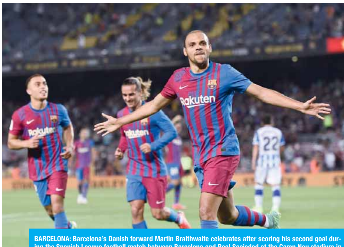
BARCELONA: Barcelona's Danish forward Martin Braithwaite celebrates after scoring his second goal during the Spanish League football match between Barcelona and Real Sociedad at the Camp Nou stadium in Barcelona on Sunday.

As Barca try to fill the Messi-sized gap, as well as ballooning debts of more than 1.2 billion euros ($1.6 billion), Real Madrid got off to a flier on the pitch as a brace from French veteran striker Karim Benzema helped bring a 4-1 victory at Alaves on Saturday. The win, achieved with further goals from Nacho and Vinicius allowed Carlo Ancelotti to celebrate the start of his second spell in charge with a victory.