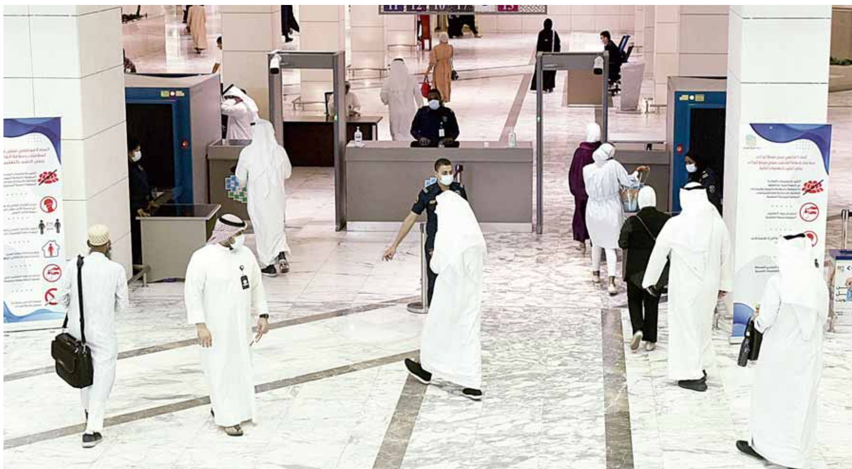
KUWAIT: Government employees are seen in an office building in Kuwait City, Kuwait, August 15, 2021. Kuwait's state departments on Sunday resumed work at full capacity as the health situation in the country is stabilizing following the vaccination campaign against COVID-19.