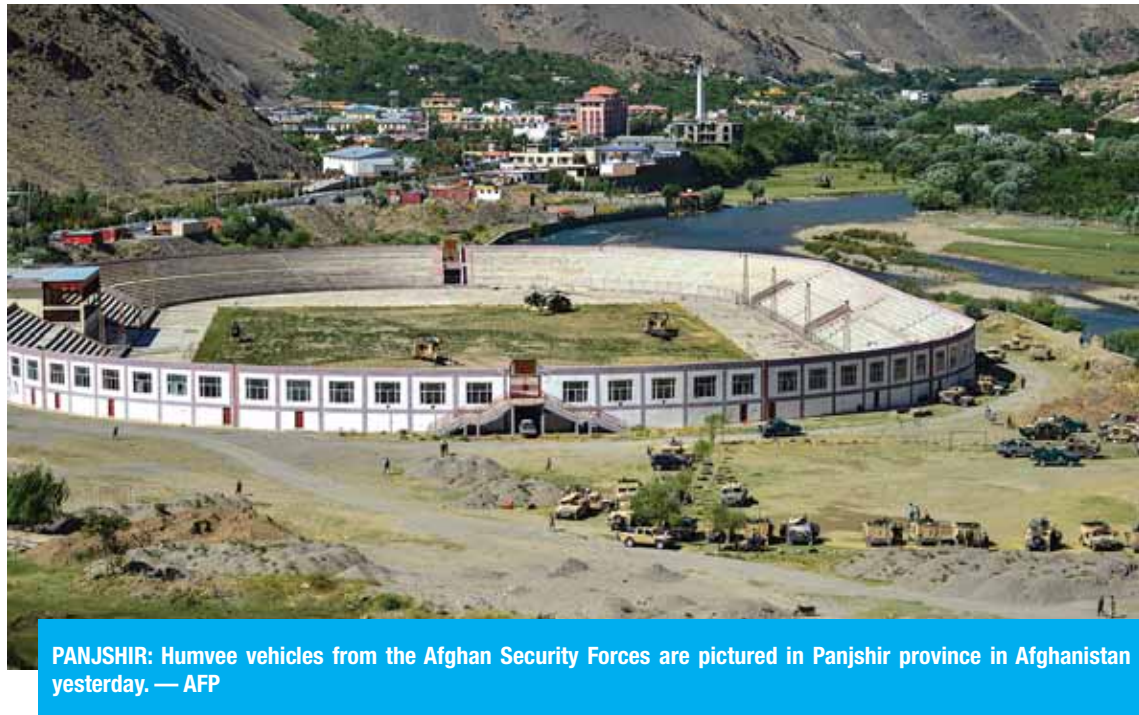
PANJSHIR: Humvee vehicles from the Afghan Security Forces are pictured in Panjshir province in Afghanistan yesterday.

No official was able to guarantee however that the three Twenty20 matches would start on September 1 after the Taliban swept to power. The team are also scheduled to play in the T20 World Cup in the United Arab Emirates in October which could also now be in doubt. The Taliban government that ruled Afghanistan from 1996 until 2001 frowned upon organized sport.