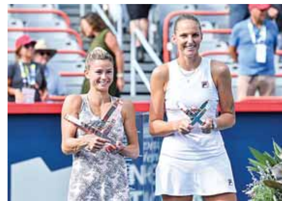
MONTREAL: Camila Giorgi of Italy (left) and Karolina Pliskova of the Czech Republic pose with their trophies after their Women's Singles Final match of the National Bank Open on Sunday in Montreal, Canada.

"I've been working all my life with my father, we work hours and hours on the court," Giorgi said. "Of course, the results should come. I believe it and he believe it. This was an amazing week, I'm very hap-