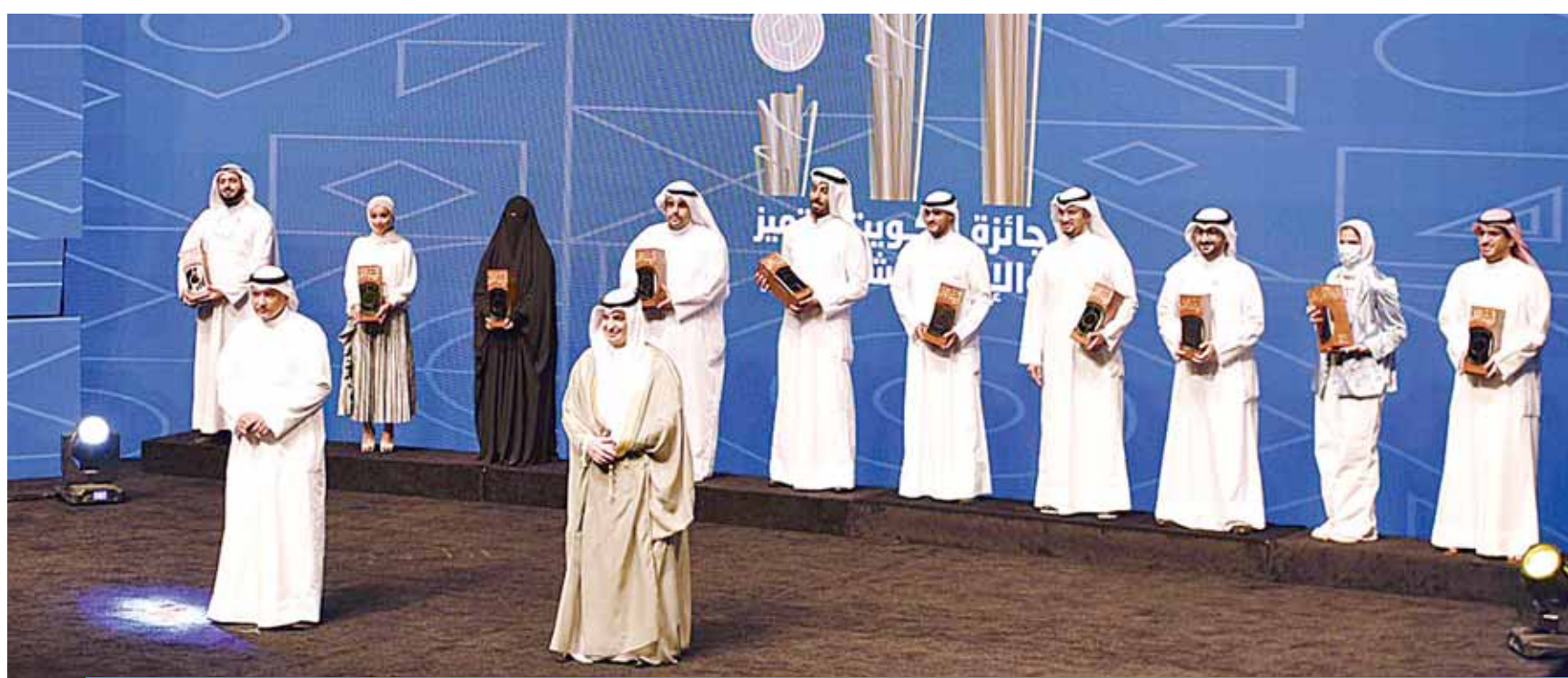
KUWAIT: State Minister for Youth Affairs Abdurrahman Al-Mutairi poses with the winners of The Kuwait Youth Excellence and Creativity Award.

KUWAIT: An annual youth award Kuwait offers to acknowledge exceptionally talented youngsters proves how significant the cohort is towards national development, a minister said. The Kuwait Youth Excellence and Creativity Award, which serves as a platform that allows the country's youth to display their varied skills, is one of many initiatives the Kuwaiti government has introduced to connect with youngsters. Information Minister and State Minister for Youth Affairs Abdurrahman Al-Mutairi said amid a lavish ceremony to honor the winners yesterday. Speaking on behalf of His Highness the Amir, the minister said the winners represent a bevy of astute entrepreneurs who have translated their ambitions into success stories, adding that such dedication is the focal point of national development plans. The minister attributed the youngsters' success to the overwhelming support they have received from the Kuwaiti leadership, saying such dedication is synonymous with national development plans. —KUNA