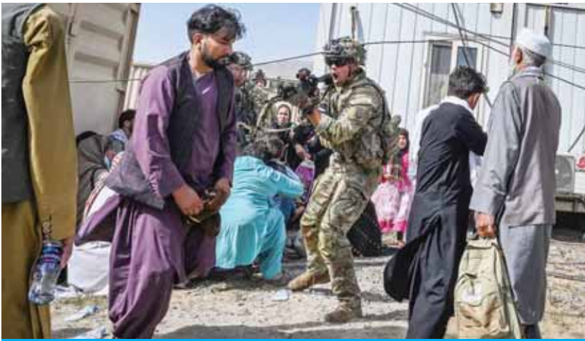
KABUL: A US soldier points his gun towards an Afghan passenger at Kabul airport yesterday.

abandoned beginning with the Doha talks,” said Husain Haqqani, Pakistan’s former ambassador to the United States, referring to the deal last year in the Qatari capital with the Taleban in which the United States set a pull-out timeline. Haqqani, now a senior fellow at the Hudson Institute, noted how US diplomats in the end could do little more than send tweets urging the Taleban to stop. “That envoys of the mightiest nation on earth can be duped as they were in Doha, and its leaders ignored so easily as they have been in the final days, will encourage others to engage in duplicitous diplomacy,” Haqqani said. Biden faced heated criticism that the withdrawal was mismanaged, with the United States racing to evacuate