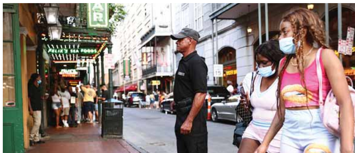
NEW ORLEANS: People gather in the French Quarter on August 15, 2021 in New Orleans, Louisiana. Beginning yesterday, people will be required to have proof of vaccination or a negative COVID-19 test to enter restaurants, bars, stadiums and certain other indoor locations.

Despite a stepped-up pace of immunizations since mid-July, only 37.9 percent of the state's population is