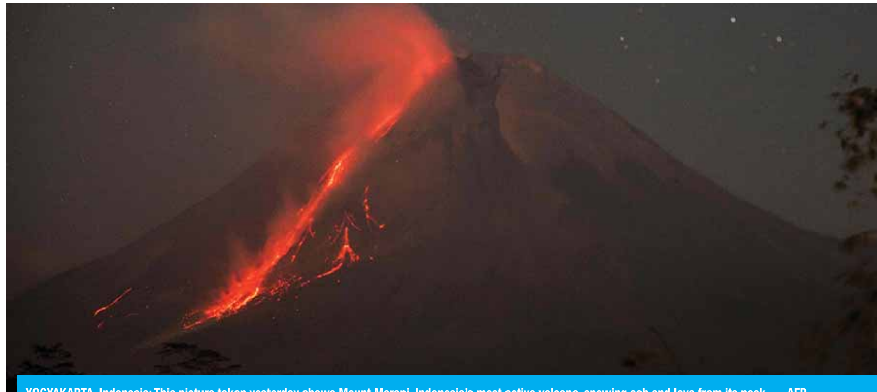
YOGYAKARTA, Indonesia: This picture taken yesterday shows Mount Merapi, Indonesia's most active volcano, spewing ash and lava from its peak. — AFP

ernment could try to form a coalition, while the opposition will also take a run at power — but it is wide open. "His replacement is anybody's guess," said Oh Ei Sun, an analyst at the Singapore Institute of International Affairs. — AFP