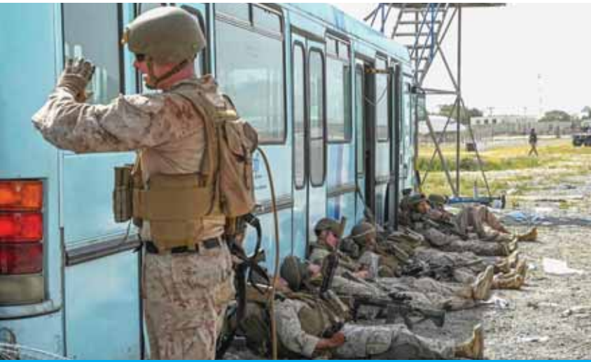
KABUL: US soldiers rest at Kabul airport yesterday.