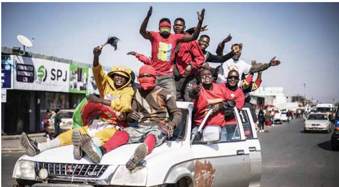
LUSAKA: Supporters of Zambian President elect for the opposition party, United Party for National Development (UPND), Hakainde Hichilema gestures as they ride on a pick up truck in the streets of Lusaka yesterday. — AFP

Thousands of supporters flocked onto the streets of Lusaka, erupting into song and dance, cheering and waving party flags. The celebrations continued into the morning. At a hotel breakfast room early yester-