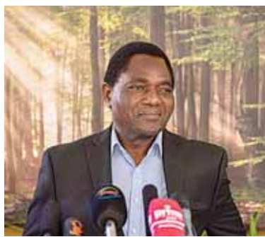
Zambia challenger wins presidency in landslide