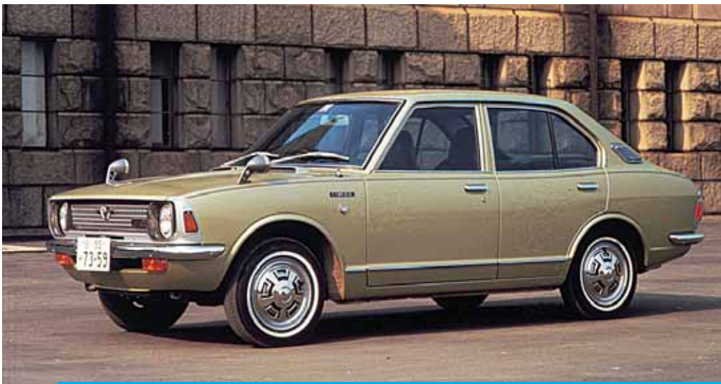
1970 Corolla, second generation