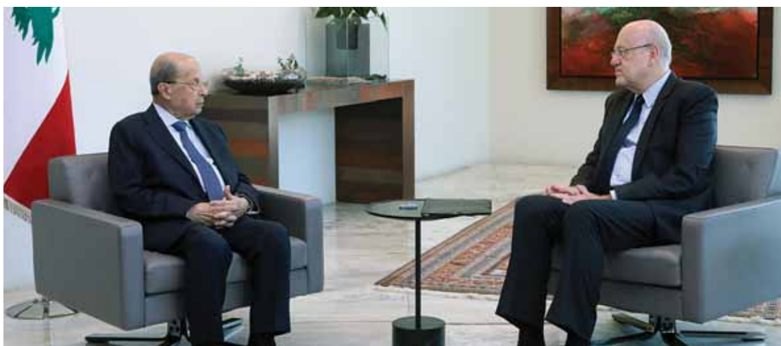
BAABDA, Lebanon: A handout picture provided by the Lebanese photo agency Dalati and Nohra shows Lebanon's President Michel Aoun meeting with premier-designate Najib Mikati at the presidential palace in Baabda, east of the capital Beirut, yesterday.

Kidnappings are just one of the challenges facing Nigeria's security forces who are battling a grinding Islamist insurgency in the northeast and separatist tensions in parts of the south.