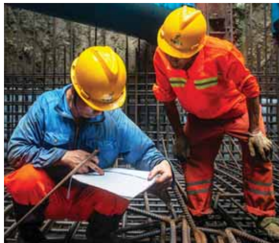
NINGBO, China: Employees working at a construction site in Ningbo, in China's eastern Zhejiang province.

COVID-19 drags on demand while recent floods disrupt businesses