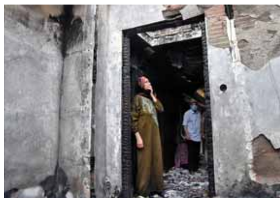
Algerians inspect the damage at their home due to forest fires in the Ait Daoud area of northern Algeria on Aug 13, 2021.

The country's richest man is the third person to attempt to form a government since the last one resigned in the aftermath of the Beirut port blast last August. Sahar Mandour of Amnesty International called the Akkar blast "a massacre resulting from an economic crisis caused by massive corruption that has been going on for years." "The latest economic crisis didn't close the door to corruption... it aggravated it to an extent that it is now deadly," she told AFP yesterday. The lack of a government is freezing international assistance that could help dig Lebanon out of the abyss. As every aspect of daily life unravels, sometimes deadly scuffles have broken out at petrol stations and residents across the country fear for their safety. —AFP