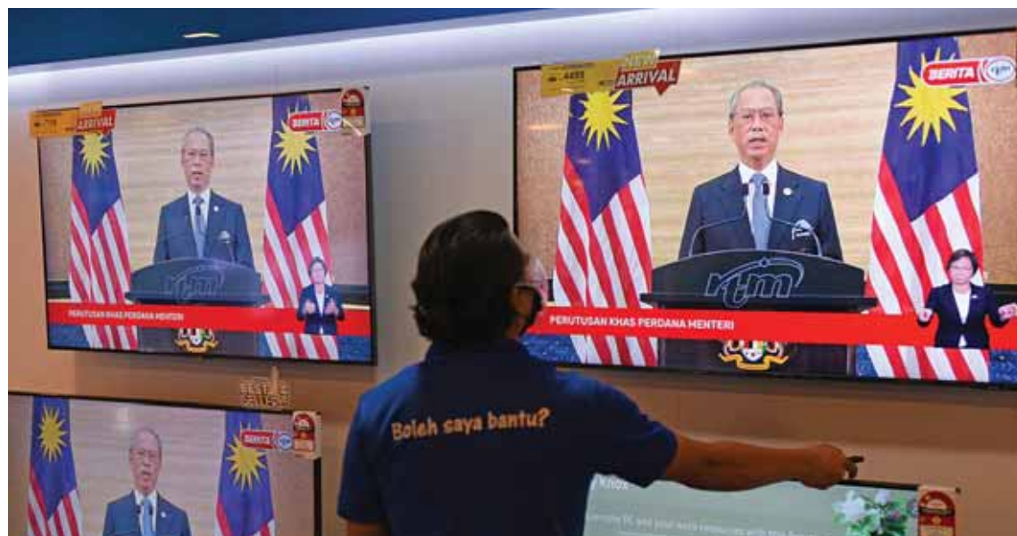
KUALA LUMPUR: A man watches a television on display at a shopping mall store as Malaysian Prime Minister Muhyiddin Yassin announces his resignation as he addresses the nation during a live telecast in Kuala Lumpur yesterday.

In January, he persuaded the king to declare Malaysia's first nationwide state of emergency for over half a century, ostensibly to fight the pandemic. But parliament was also suspended for months, leading to criticism that Muhyiddin was using the crisis to avoid a no-confidence vote. Muhyiddin's position finally became untenable after a group of once allied MPs withdrew support, depriving him of a parliamentary majority turned against him.