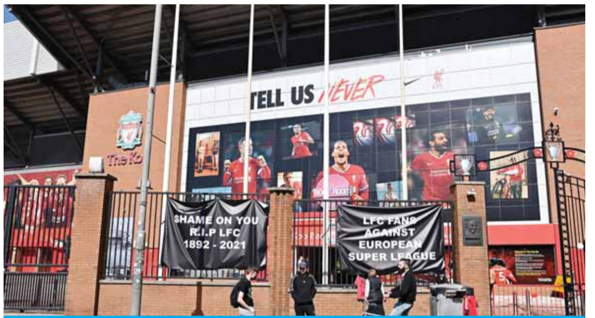
LIVERPOOL: Anti-European Super League posters hang outside Anfield stadium, home of English Premier League football club Liverpool, in Liverpool, north west England yesterday.

Yesterday's breakaway announcement came just hours before UEFA planned to announce a new format for the Champions League which had been con-