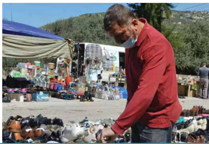
(Left) People shop for vegetables at Souk al-Marj. (Right) A shoe seller at Souk al-Marj arranges his products on April 13, 2021.