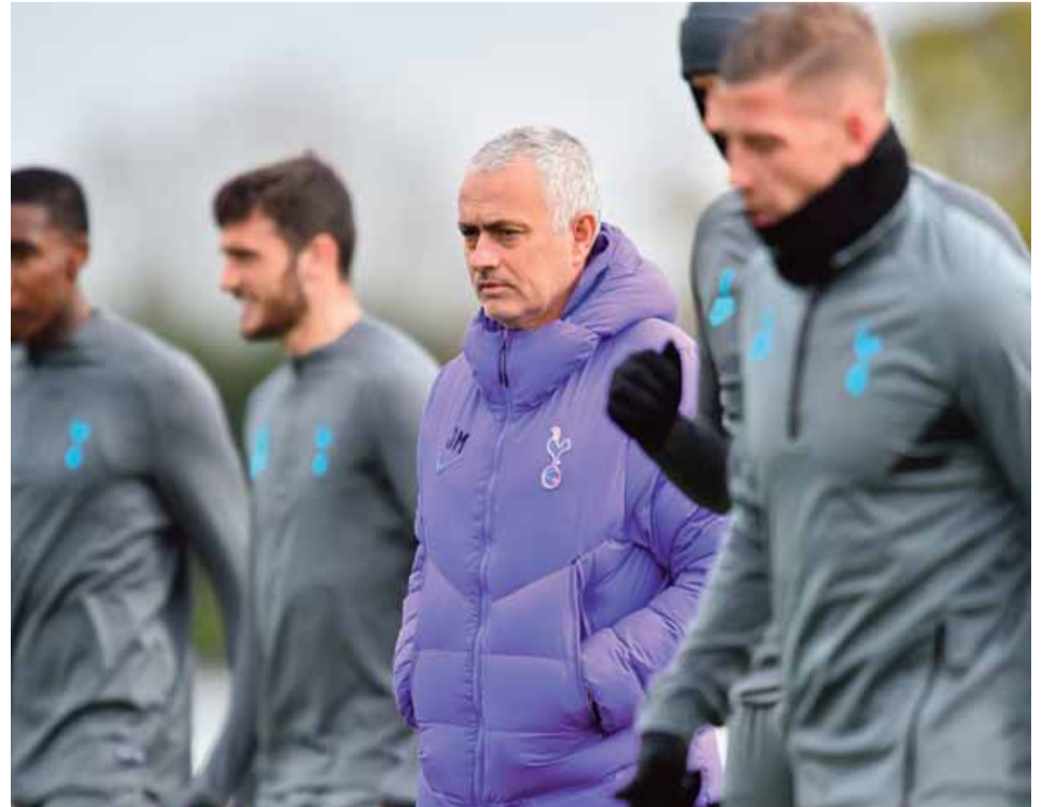
LONDON: In this file photo taken on March 09, 2020 Tottenham Hotspur's Portuguese head coach Jose Mourinho (center) attends a team training session at Tottenham Hotspur's Enfield Training Centre, in north London, ahead of their UEFA Champions League Last 16 second-leg football match against RB Leipzig.

He also led Inter Milan to Champions League glory in 2010 and won La Liga with Real Madrid. But his second spell at Chelsea ended in acrimony