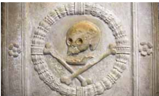
The tombstone of noblewoman Akylina, daughter of the bishop of Lefkara, bearing a skull and crossbones, is pictured.