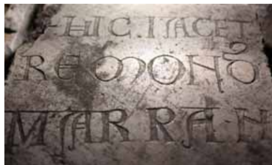
A Crusader tombstone is pictured.