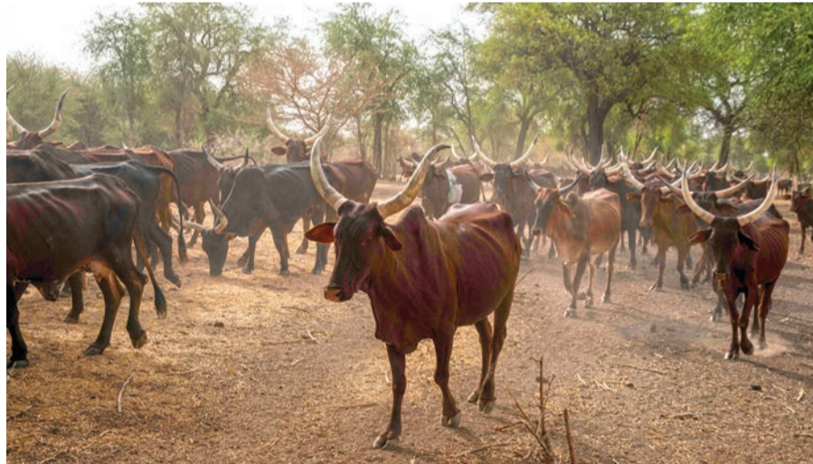
A flock of zebu are pictured near the Dinder National Park.

'Great harm to wildlife' Villagers say they do their best to follow park restrictions but add that they desper-