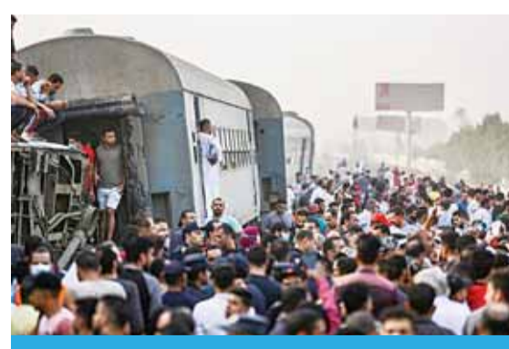
People gather by an overturned train carriage at the scene of a railway accident in the city of Toukh in Egypt's central Nile Delta province of Qalyubiya Sunday.