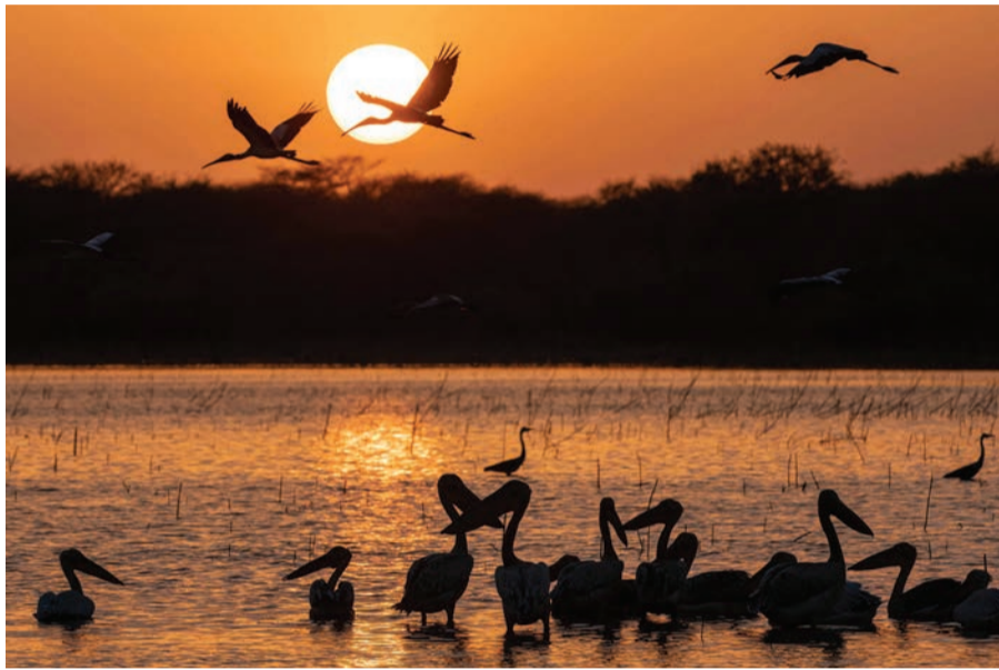
Cranes fly over pelicans feeding in the water at sunset at the "Ain Al-Shams" a seasonal lake within the Dinder National Park.