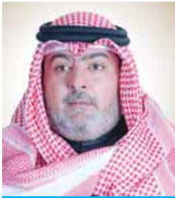
Sheikh Thamer Ali Al-Sabah

KUWAIT: Minister of Interior Sheikh Thamer Ali Sabah Al-Sabah has issued a decision delaying for six months payment of loan installments for the police squad, due for the police administration fund. The MoI Department of Public Relations and Security Information said in a statement, on Sunday, that the minister's decision came due to the extraordinary conditions caused by combating the novel coronavirus at the local level. Moreover, the minister has taken the decision in appreciation for the national role undertaken by the personnel amid the emergency health circumstances. —KUNA