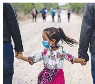
People smugglers reap billions selling 'big American dream'