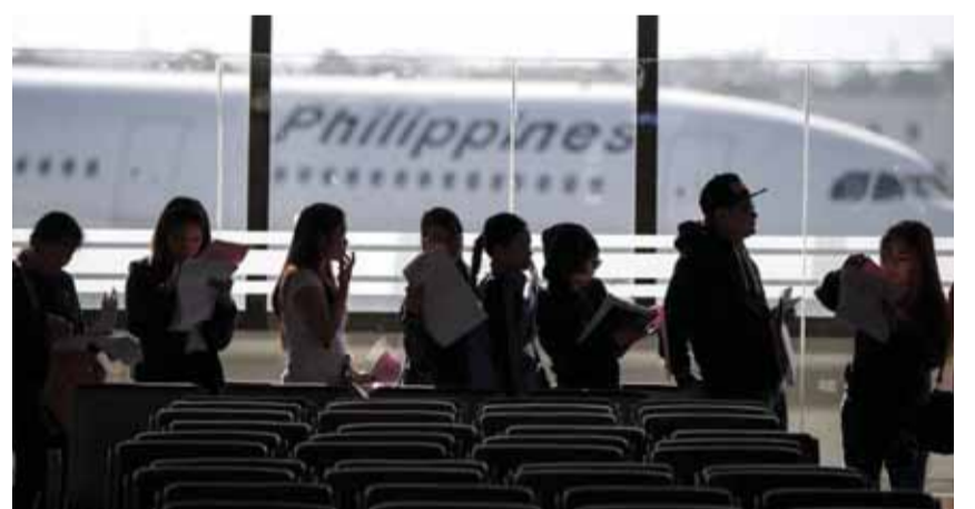
The Philippine Overseas Labor Office (POLO) in Kuwait announced yesterday that the embassy is resuming the processing of documents for the deployment of Filipino domestic helpers to Kuwait. — AFP