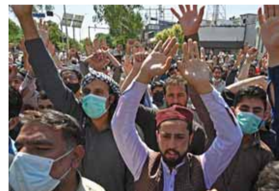
ISLAMABAD: Traders shout slogans as they take part in a protest at a closed market area during a nationwide strike called by various groups to show solidarity with the Tehreek-e-Labbaik Pakistan (TLP) party after TLP's leader was detained following his calls for the expulsion of the French ambassador, in Islamabad yesterday. — AFP

SUVA: Fiji ordered two of its largest cities into lockdown yesterday after the Pacific island nation recorded its first case of COVID-19 community transmission in 12 months. Health authorities said the case was a 53 year-old woman who was a close contact of a soldier who contracted the virus at a quarantine facility in Nadi. "To aid rapid contact tracing and reduce the likelihood of further transmission, we are announcing a lockdown of the greater Nadi and Lautoka area, starting from 4 am this morning," the health department said in a statement. — AFP