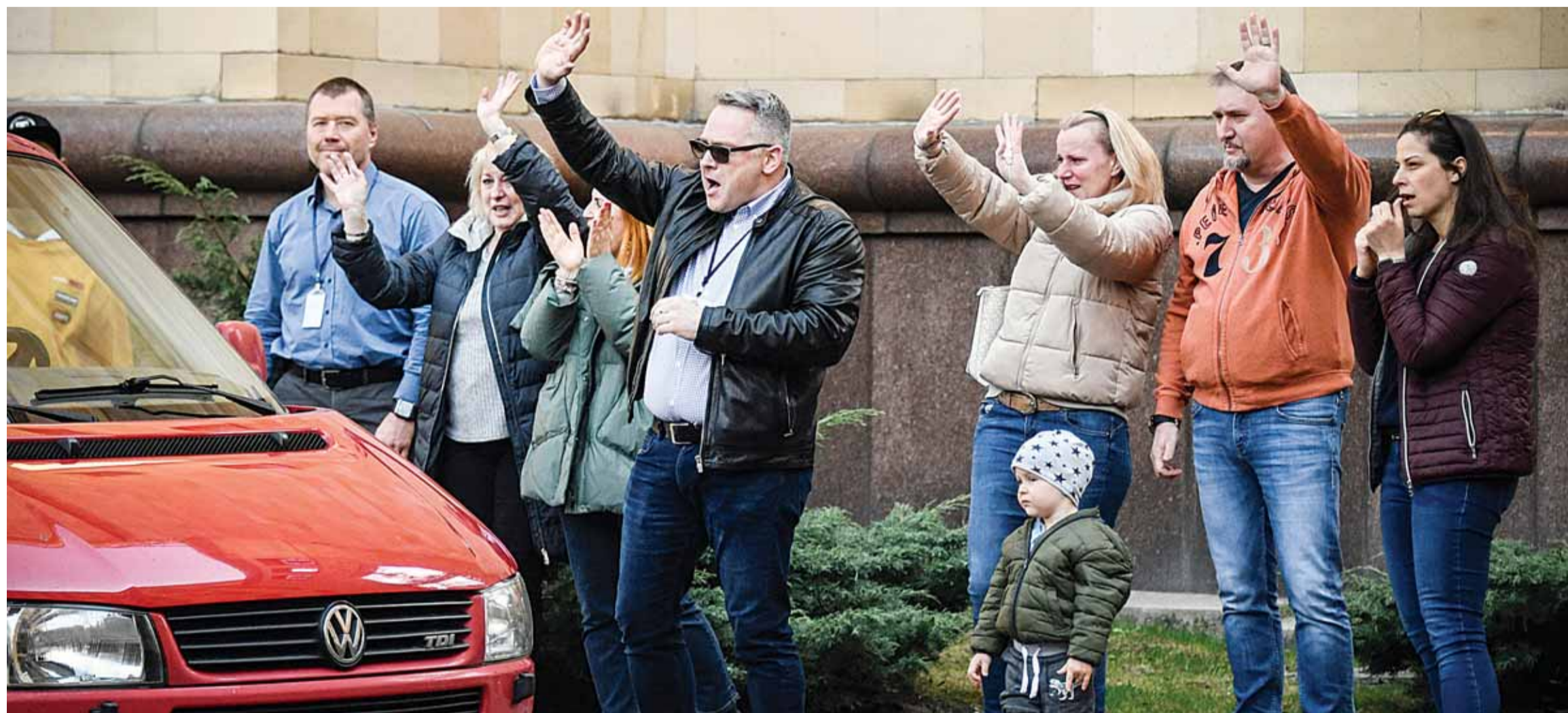
MOSCOW: Czech diplomats and their family members leave the grounds of the country's embassy in Moscow yesterday.