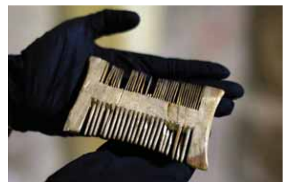
An archaeological officer shows a comb, said to be from the time of the crusades.