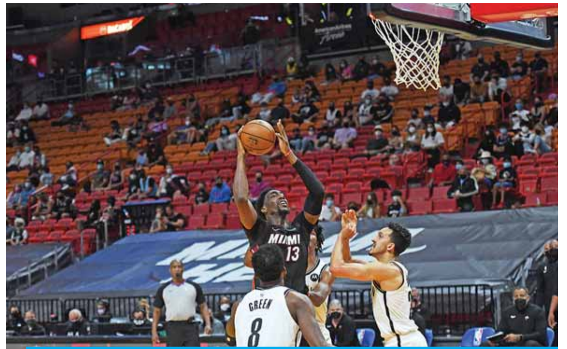
MIAMI: Bam Adebayo #13 of the Miami Heat shoots the ball against the Brooklyn Nets on Sunday at American Airlines Arena.

In New York, Julius Randle finished with 33 points and 10 assists as the New York Knicks withstood a 34-point performance from Zion Williamson by beating the New Orleans Pelicans 122-112 in overtime. Derrick Rose came off the bench to score a season-high 23 points, and RJ Barrett tallied 18 as the Knicks beat the Pelicans for the second time in three games. Both Barrett and Reggie Bullock, who had 15, contributed offensively before fouling out. Williamson also had nine rebounds and five assists, Eric Bledsoe scored 22 and Brandon Ingram added 19 for the Pelicans, who lost in overtime for the second consecutive game. Randle nailed two free throws with just over two minutes to go in overtime to give the Knicks a 112-105 lead, and New York cruised from there.