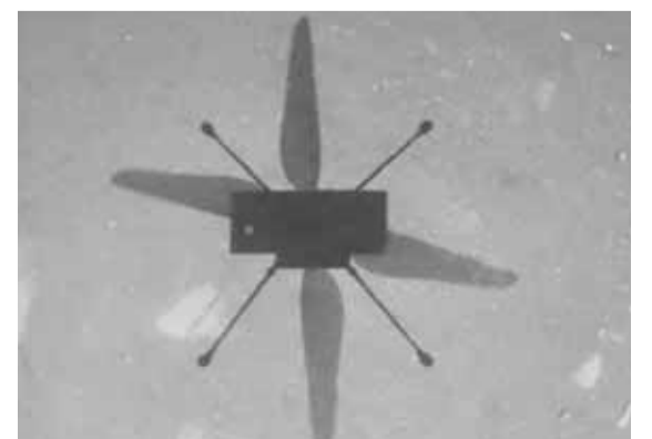
NASA's Ingenuity Mars Helicopter captured in this shot as it hovered over the Martian surface yesterday.