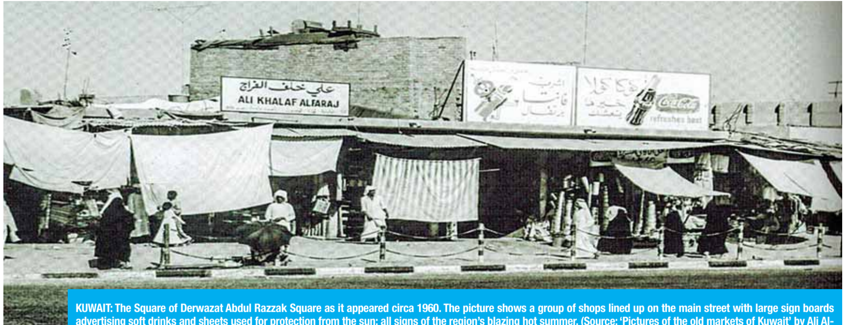
KUWAIT: The Square of Derwazat Abdul Razzak Square as it appeared circa 1960. The picture shows a group of shops lined up on the main street with large sign boards advertising soft drinks and sheets used for protection from the sun; all signs of the region's blazing hot summer.