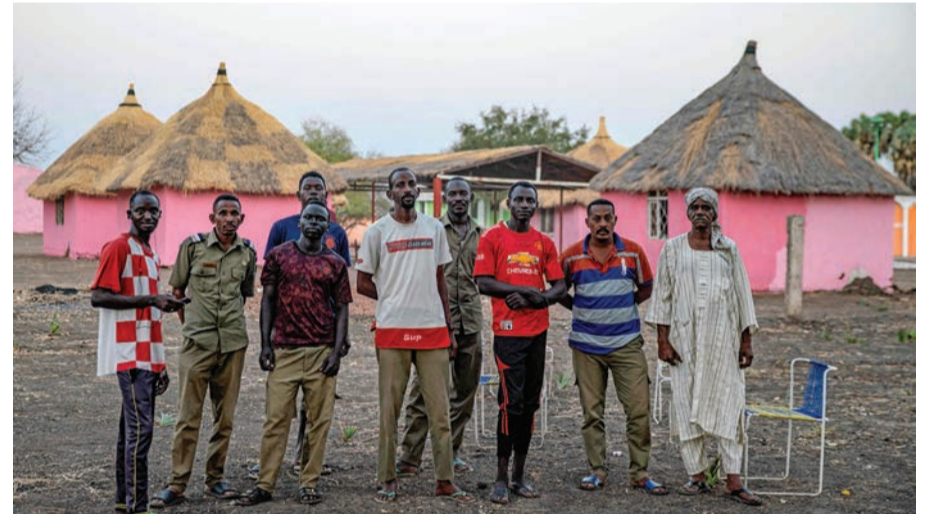
A group of rangers are pictured outside their headquarters of Galegu within the Dinder National Park.