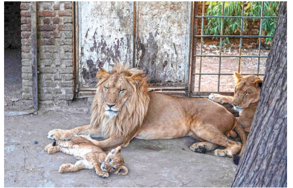
A lion family is pictured at the small zoo within the Dinder National Park.