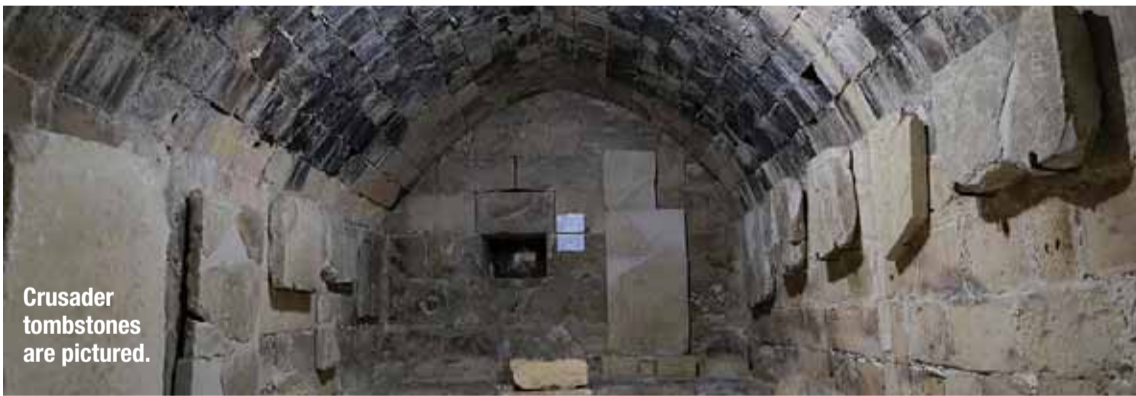
Crusader tombstones are pictured.