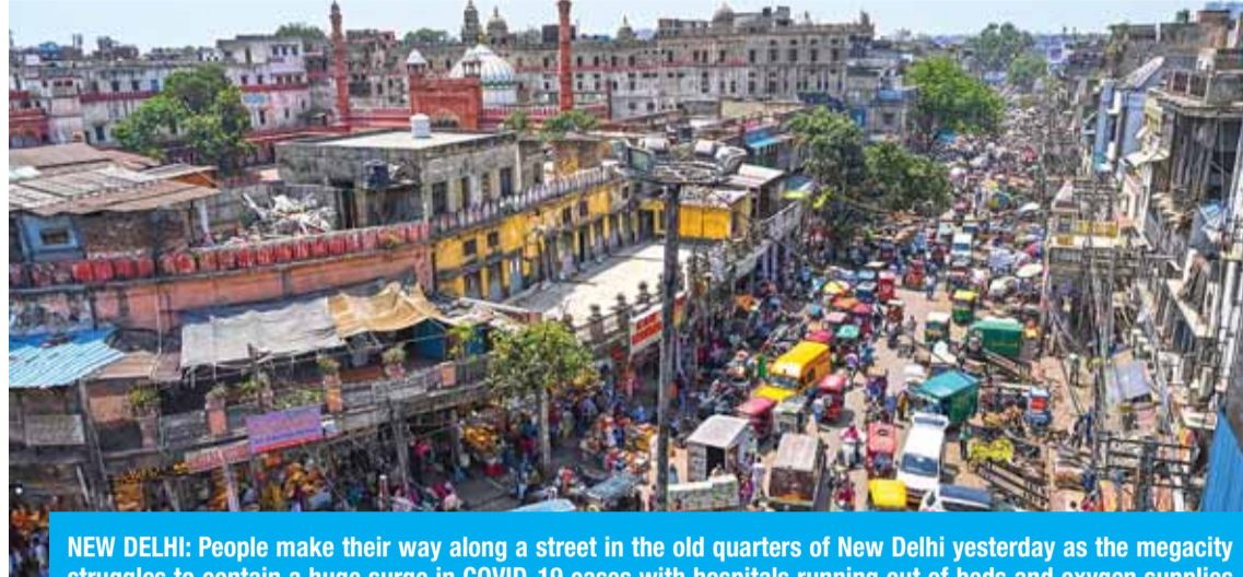
NEW DELHI: People make their way along a street in the old quarters of New Delhi yesterday as the megacity struggles to contain a huge surge in COVID-19 cases with hospitals running out of beds and oxygen supplies low.

The coronavirus has killed more than 3 million people, devastating the world economy and upending daily life since emerging in China in late 2019. The United States remains the hardest-hit nation, with more deaths and known infections than anywhere else, but it passed a major vaccine milestone on Sunday with roughly 130