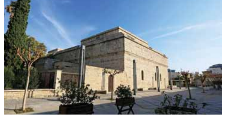
A picture shows the Limassol medieval castle, now housing the Cyprus Medieval Museum in the coastal Cypriot city.