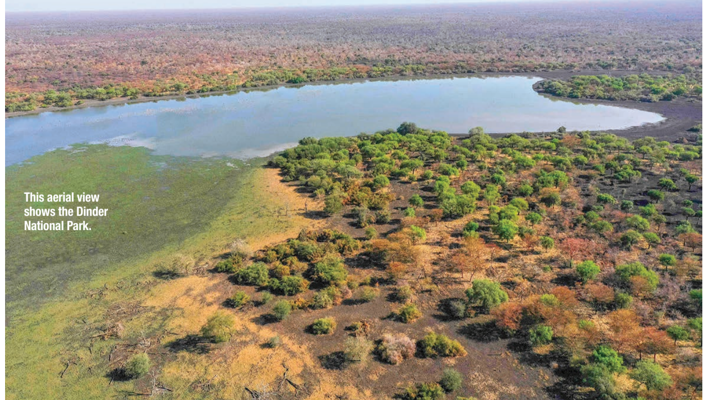
This aerial view shows the Dinder National Park.