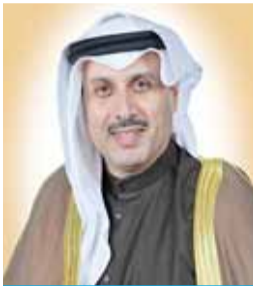
Sheikh Hamad Jaber Al-Sabah

KUWAIT: Deputy Prime Minister and Minister of Defense (MoD) Sheikh Hamad Jaber Al-Ali Al-Sabah on Sunday issued a decision delaying for six months the payment of loan installments for the military personnel, due for the army fund. The General Staff of the Kuwait Army said in a statement that the move came in recognition from the Ministry of Defense for the military personnel's national role in such emergency health conditions. —KUNA