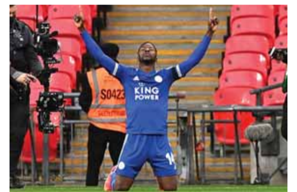
LONDON: Leicester City's Nigerian striker Kelechi Iheanacho celebrates after scoring the opening goal of the English FA Cup semifinal football match between Leicester City and Southampton at Wembley Stadium on Sunday.

LONDON: Leicester reached the FA Cup final for the first time in 52 years as Kelechi Iheanacho's solitary goal earned a 1-0 win over Southampton in front of 4,000 fans at Wembley on Sunday. The biggest crowd for a football match in England for 13 months was made up of key workers and local residents as part of a test event for the return of fans in bigger numbers in the coming weeks.