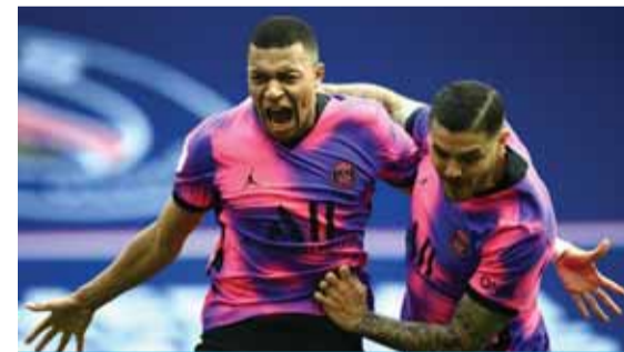
PARIS: Paris Saint-Germain's French forward Kylian Mbappe celebrates with Argentinian forward Mauro Icardi after scoring a goal during the Ligue 1 football match between PSG and Saint-Etienne at the Parc des Princes Stadium on Sunday.

Lyon held on to edge out relegation-threatened Nantes at the Stade de la Beaujoire. Rudi Garcia's side looked to be well on their way to a crucial three points courtesy of Memphis Depay's first-half double. Defender Nicolas Pallois gave Nantes hope in the 61st minute, but Lyon closed out the win to leave the Canaries second-bottom, three points behind Nimes in the relegation play-off spot and four points from guaranteed safety.