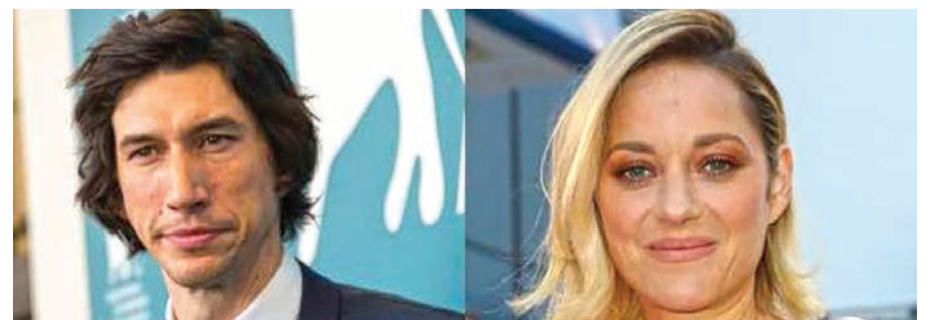
Adam Driver and Marion Cotillard

The film will run as part of the main competition for the Palme D'Or, with the jury this year headed by US director Spike Lee. The Cannes Film Festival, usually held in May, has been postponed to July 6-17 this year due to the coronavirus pandemic. The trade fair that runs alongside the festival has been moved online and is due to be held from June 21 to 25. — AFP