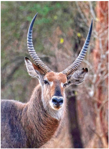
A Waterbuck is pictured at the Dinder National Park.