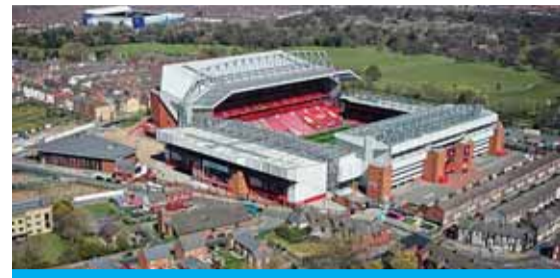
LIVERPOOL: An aerial photo shows Anfield stadium (right), home of English Premier League football club Liverpool, and Goodison Park, home of Premier League club Everton (left), in Liverpool, north west England yesterday.

Even Chelsea, thanks to the wealth of Russian oligarch owner Roman Abramovich, have left some of their competitors trailing in the arms race for talent in