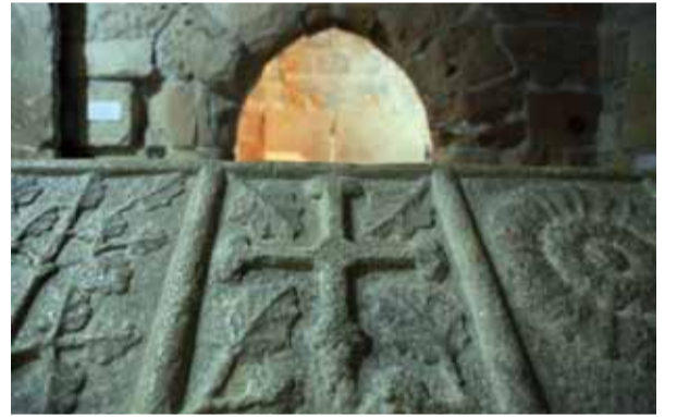
The cross of the Knights Templar engraved on the 14th century sarcophagus of Adam de Antiochia, Marshal of Cyprus, is pictured.