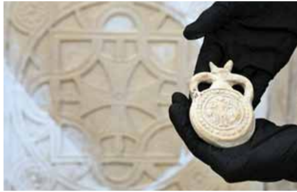
Archaeological officer Elena Stylianou shows a clay ampoule that used to contain holy water.