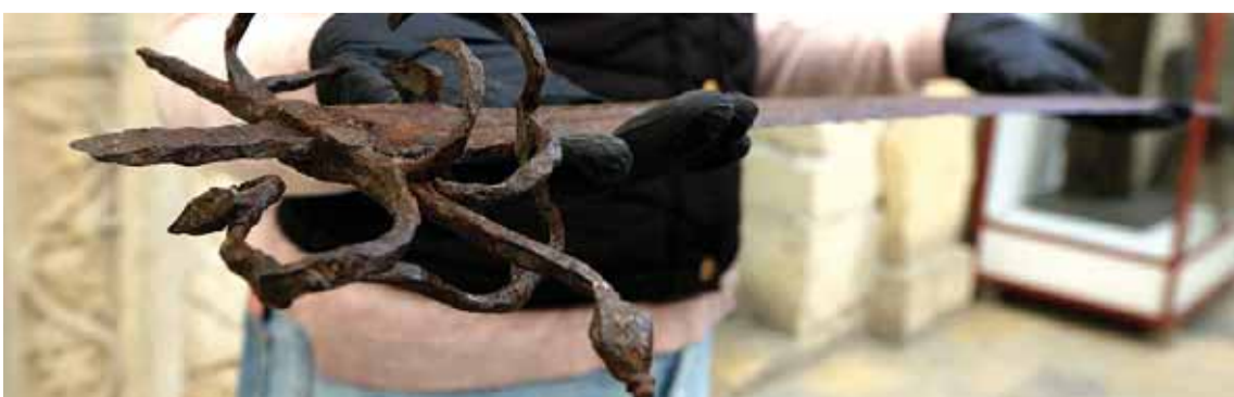
An archaeological officer shows a sword thought to be from the period of the crusades.