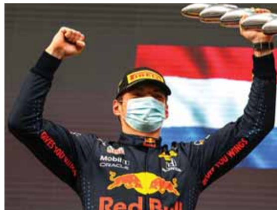
IMOLA, Italy: Winner Red Bull's Dutch driver Max Verstappen celebrates on the podium after the Emilia Romagna Formula One Grand Prix at the Autodromo Internazionale Enzo e Dino Ferrari race track on Sunday.

Once racing got underway Verstappen's silky smooth getaway proved decisive, the Dutchman leading out of the first corner, more or less untouched from here to the chequered flag by the mayhem in his wake. A high-speed crash concerning Bottas and George