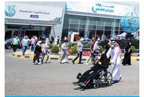
KUWAIT: People queue as they wait their turn to receive a dose of a vaccine against the coronavirus, in front of the makeshift Kuwait Vaccination Center, at the Kuwait International Fairground in Mishref, on Sunday.

deaths to 1,448 respectively, noted the ministry's spokesman Dr Abdullah Al-Sanad. He pointed out that some 1,438 more people had been cured of the virus over the same period, raising the total of those who have overcome the disease to 240,465. He added that the number of people hospitalized with the virus stood at 15,074, with 250 of them in intensive care units as of Sunday. Dr Sanad revealed that some 6,269 swab tests were conducted over the last day, increasing the total to 2,219,893. He renewed calls for the public to abide by health precautions to curb the spread of the virus. The Ministry of Health had announced Saturday that Kuwait registered four new COVID-19 fatalities and 1,388 new infections in the previous 24 hours. Kuwait had announced eight deaths and 1,406 new on Friday, in addition to five deaths and 1,391 cases on Thursday. ICU patients remained at 250 for the second straight day after they had went slightly up from 247 on Friday.