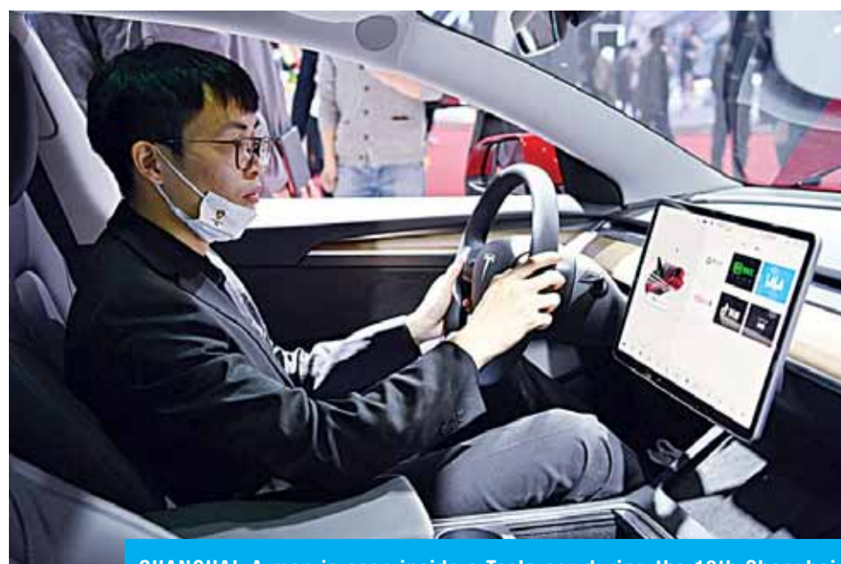
SHANGHAI: A man is seen inside a Tesla car during the 19th Shanghai International Automobile Industry Exhibition yesterday.

Herman said police had not yet determined whether the driver-side airbag had deployed and whether the car's driver assistance system was