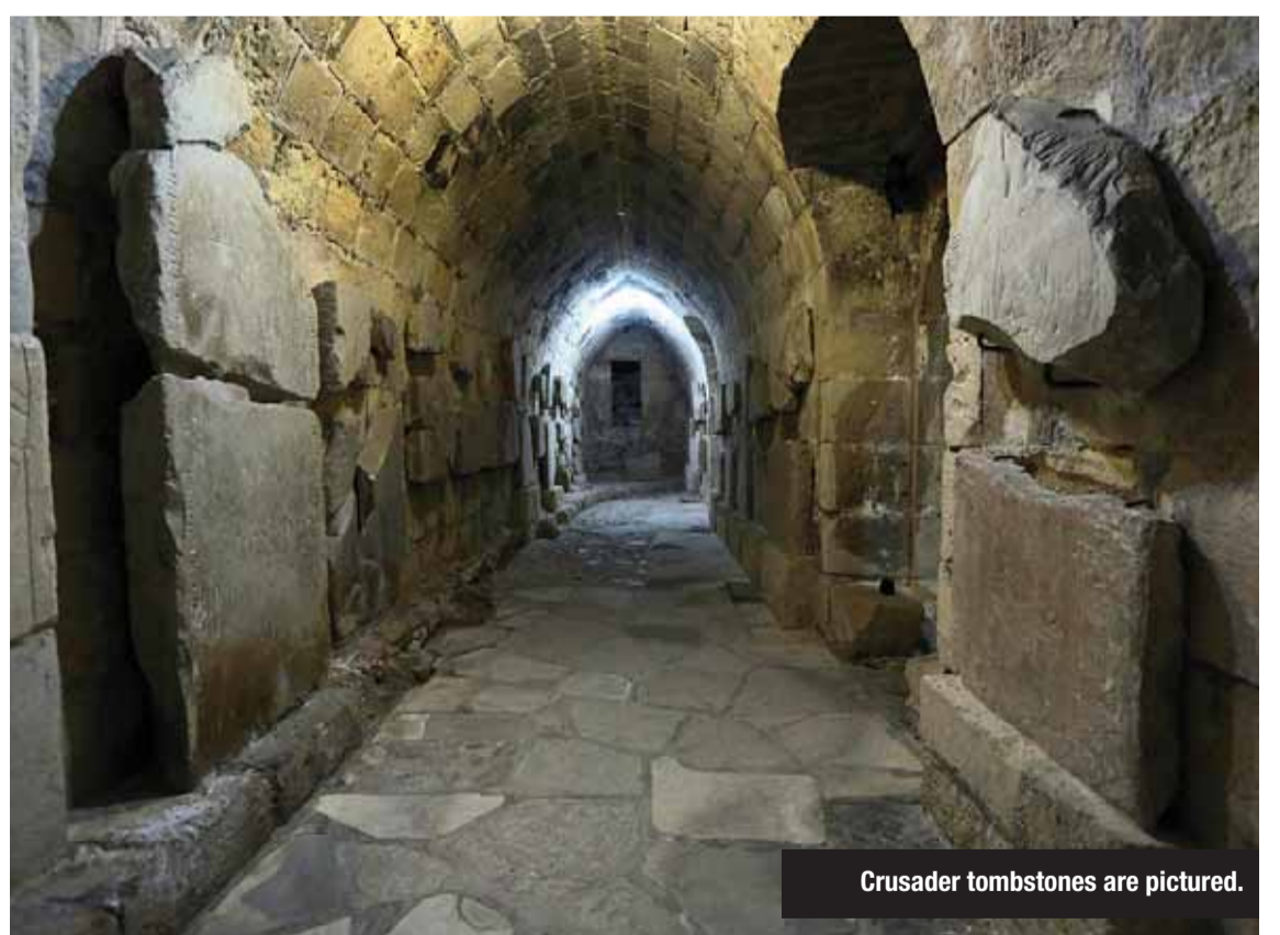
Crusader tombstones are pictured.