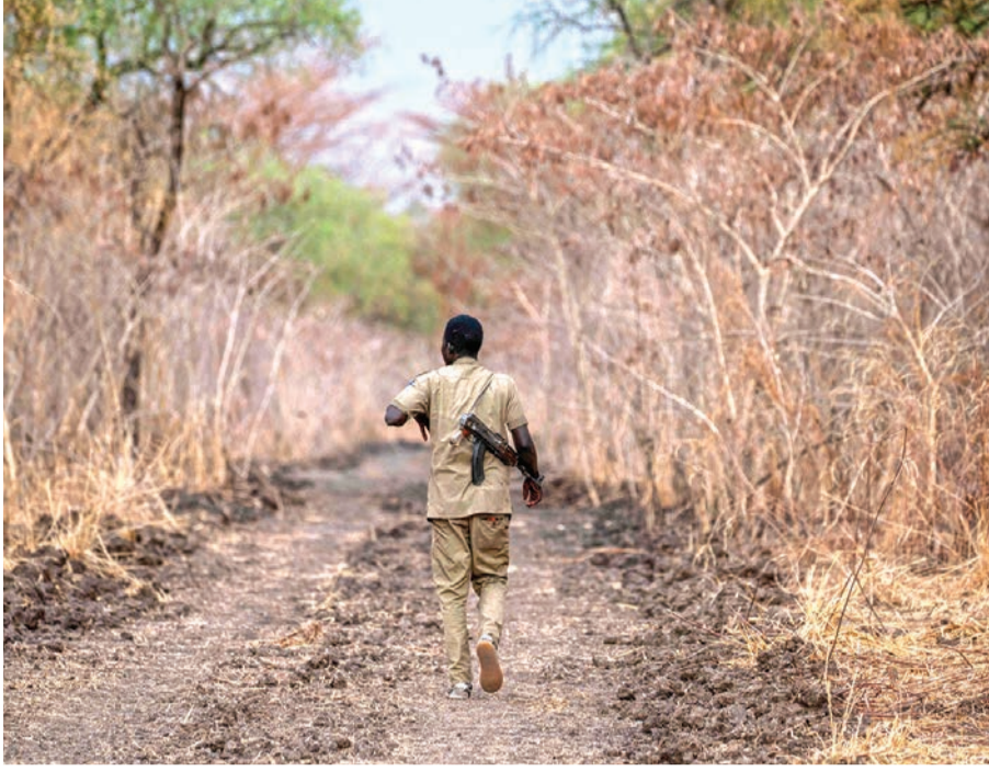
A ranger patrols in the Dinder National Park, about 400 kms southeast of the Sudanese capital.