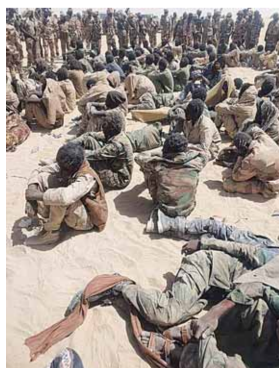
This image made available courtesy of the Chadian Army Sunday shows alleged rebel soldiers belonging to the FACT sitting in the sand after having been captured following clashes with the Chadian army in Nyze, 50km North east of Zigueye. —AFP

The African Development Bank announced earlier this month a $170 million loan to improve safety on Egypt's rail network. The bank said the money would be used "to enhance operational safety and to increase network capacity on national rail lines". "The planned