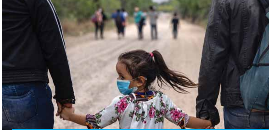
LA JOYA, Texas: An immigrant child glances back towards Mexico after crossing the border into the United States in La Joya, Texas.