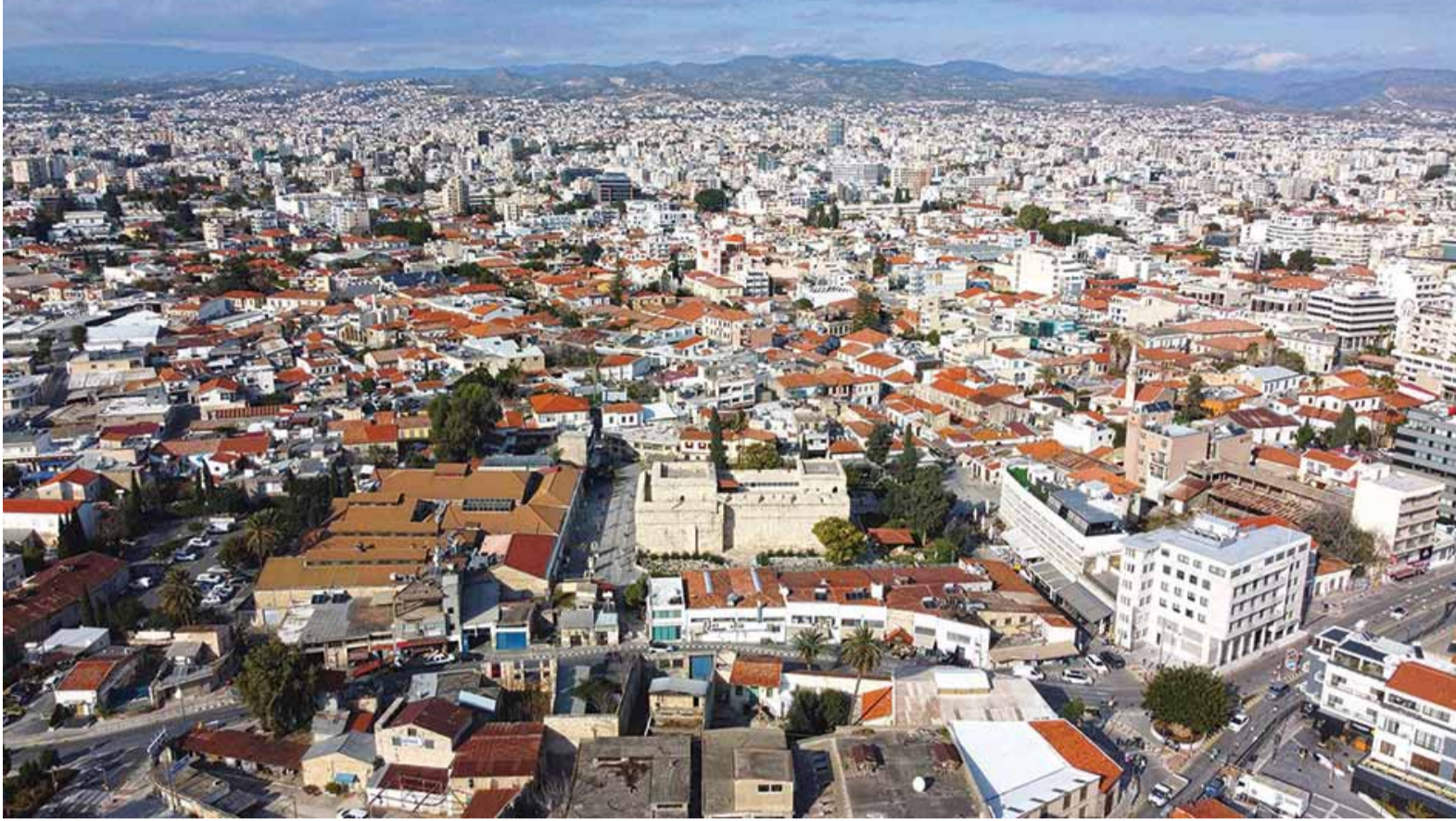
A picture shows the Limassol medieval castle (center), now housing the Cyprus Medieval Museum in the coastal Cypriot city.