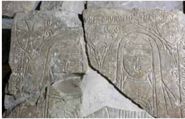
A Crusader tombstone on the site where a chapel of the Knights Templar was built at the Limassol medieval castle.

Cyprus is dotted with castles and ruins left by the Crusaders, including the castle of Kolossi, once a key base of the Knights Hospitallers, and the dramatic fortress of Saint Hilarion. Perched on a mountain