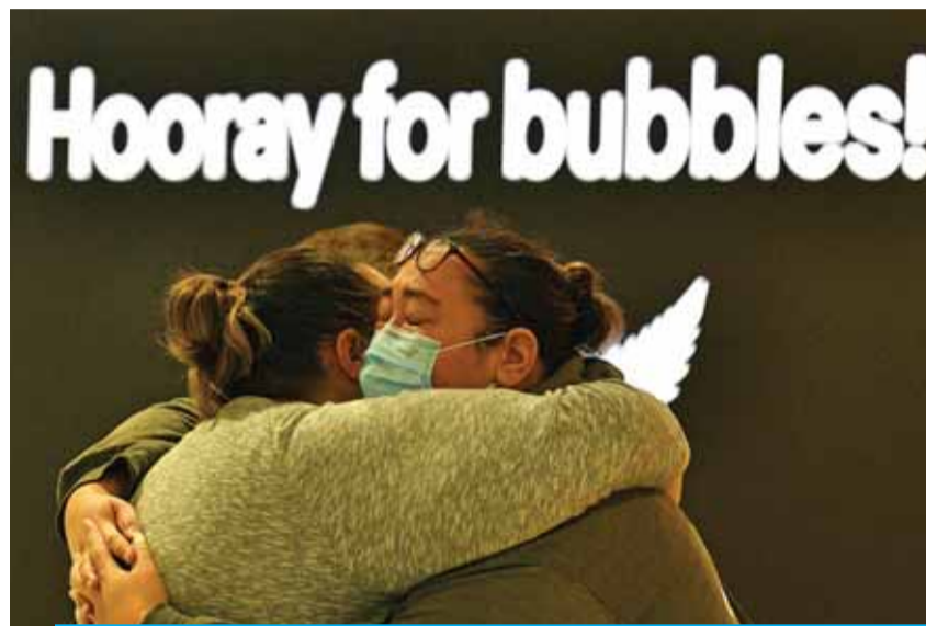
(Left) A woman hugs a family member before his departure for New Zealand at Sydney International Airport yesterday as Australia and New Zealand opened a trans-Tasman quarantine-free travel bubble. (Right) Families are reunited as travelers arrive on the first flight from Sydney in Wellington yesterday.