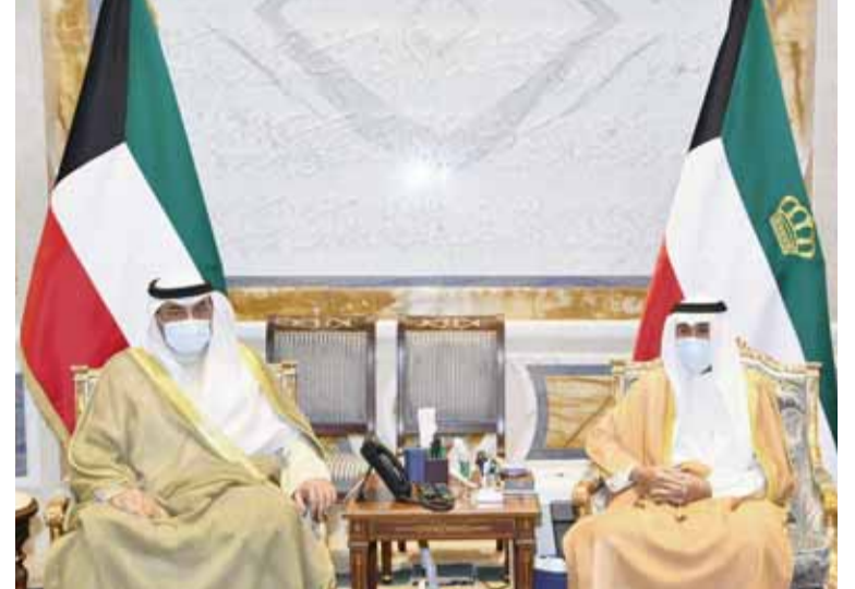
His Highness the Amir Sheikh Nawaf Al-Ahmad Al-Jaber Al-Sabah meets His Highness the Prime Minister Sheikh Sabah Al-Khaled Al-Hamad Al-Sabah.

KUWAIT: His Highness the Amir Sheikh Nawaf Al-Ahmad Al-Jaber Al-Sabah received His Highness the Crown Prince Sheikh Mishal Al-Ahmad Al-Jaber Al-Sabah at Bayan Palace yesterday. His Highness the Amir also received National Assembly Speaker Marzouq Al-Ghanem, His Highness the Prime Minister Sheikh Sabah Al-Khaled Al-Hamad Al-Sabah and Deputy Prime Minister and Minister of