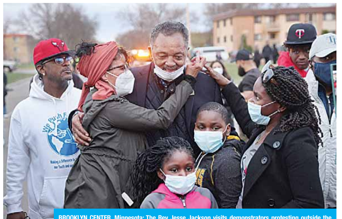
BROOKLYN CENTER, Minnesota: The Rev. Jesse Jackson visits demonstrators protesting outside the Brooklyn Center police station Saturday.

"I convened a meeting today with media and law enforcement to determine a better path forward to protect the journalists covering civil unrest." Tensions are running especially high in