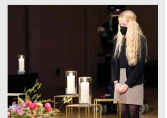
BERLIN: The daughter of a victim stands in front of a candle to pay her respects during a ceremony for Germany's victims of the coronavirus pandemic at the Konzerthaus concert hall yesterday.—AFP

Attacks against civilians have increased since the beginning of the year — more than 300 people died in three series of attacks in the western Niger. No one has claimed responsibility for the attacks so far.—AFP