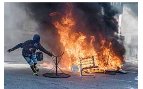
PORT-AU-PRINCE, Haiti: In this file photo a protestor moves from the fire during a demonstration in Port-au-Prince. Catholic Church warned of the restive island's "descent into hell" and slammed government inaction after 10 people, including members of the clergy and French citizens, were abducted by kidnapers demanding $1 million ransom.