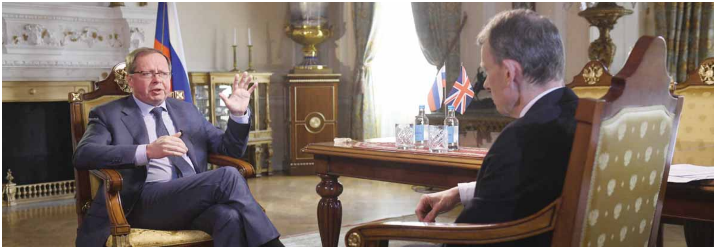
LONDON: Ambassador of Russia to the UK Andrei Kelin (left) talks during a pre-recorded interview with British journalist Andrew Marr. Britain said yesterday that it "stands in full support of our Czech allies" after Prague expelled 18 Russian diplomats identified as secret agents of the Russian intelligence service.