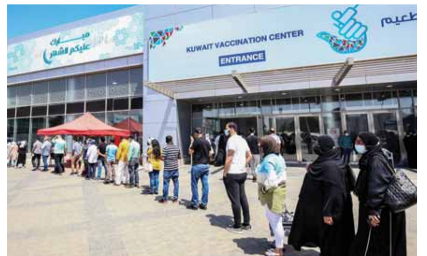
KUWAIT: People queue as they wait their turn to receive a dose of a vaccine against the coronavirus, in front of the makeshift Kuwait Vaccination Center at the Kuwait International Fairground in Mishref yesterday.

The numbers are a slight drop from the daily figures announced the two days before. Kuwait had announced eight deaths and 1,406 new on Friday, in addition to five deaths and 1,391 cases on Thursday. On the other hand, ICU patients have increased for the third straight day after their numbers went slightly up from 244 on Thursday to 247 on Friday. Meanwhile, the infections-to-swab ratio went back up on Saturday after it had reached 15.18 percent on Friday, down from 16.12 percent the previous day. Dr Sanad called on the public to maintain social distancing, and to abide with all health regulations that would help in stopping the virus spread.