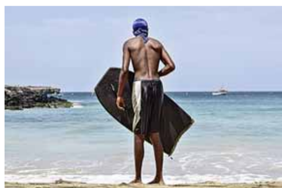
A young person holds a body board while looking at the ocean in Tarrafal.