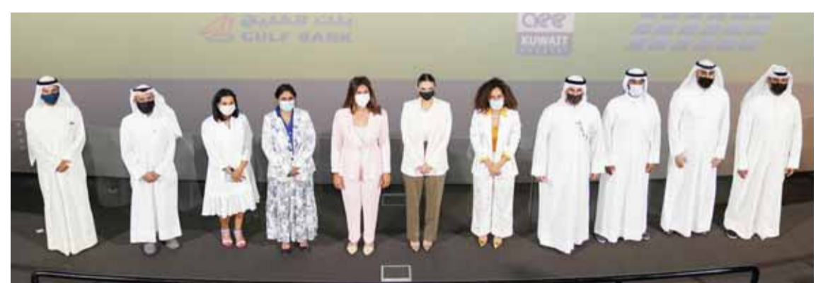
KUWAIT: Group photo of the speakers.