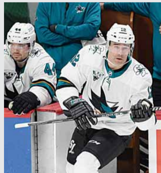
ST PAUL: Patrick Marleau #12 of the San Jose Sharks steps onto the ice from the bench during the first period of the game against the Minnesota Wild at Xcel Energy Center on Saturday in St Paul, Minnesota.

Also, league scoring leader Bradley Beal scored 37 points and the Washington Wizards defeated the Detroit Pistons 121-100 to stretch their winning streak to four games. In Chicago, Nikola Vucevic scored 25 points and added seven rebounds with five assists as the Chicago Bulls defeated the Cleveland Cavaliers 106-96.