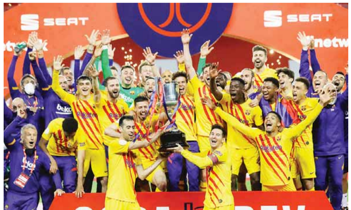
SEVILLE: A handout picture released by the Spanish Football Federation (RFEF) shows Barcelona's players celebrating with the trophy at the end of the Spanish Copa del Rey (King's Cup) final football match between Athletic Club Bilbao and FC Barcelona at La Cartuja stadium in Seville on Saturday.

Sergino Dest dragged wide while Inigo Martinez had Athletic's best chance but as he stretched for the bouncing ball, he could only poke over. Athletic seemed to have played their way into the match before half-time but Barcelona came out with renewed vigour, with Unai Simon making two bril-