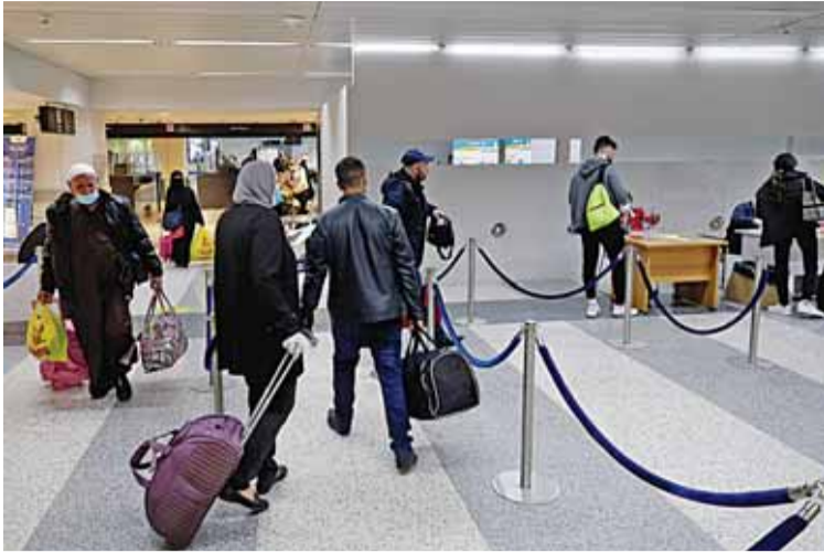
Passengers queue to get tested for COVID-19 upon their arrival at Lebanon's Rafiq Hariri International Airport in Beirut.