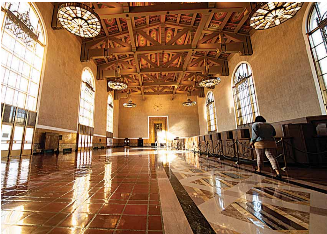
In this file photo a view of the old ticketing concourse at the Downtown Los Angeles Union Station where part of the 2021 Oscars Ceremony will take place.