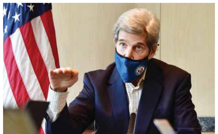
SEOUL: US Special Presidential Envoy for Climate John Kerry speaks during a press conference yesterday.

Longer-term actions that need to be taken to keep the temperature goals of the Paris accord "within reach" include reducing emissions from industry and power generation while stepping up renewable energy, clean transportation and climate-resistant agriculture. The United States and China's pledge to cooperate on climate follows recent