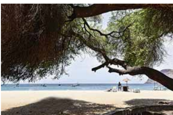
A general view of a beach in Tarrafal, Cape Verde.