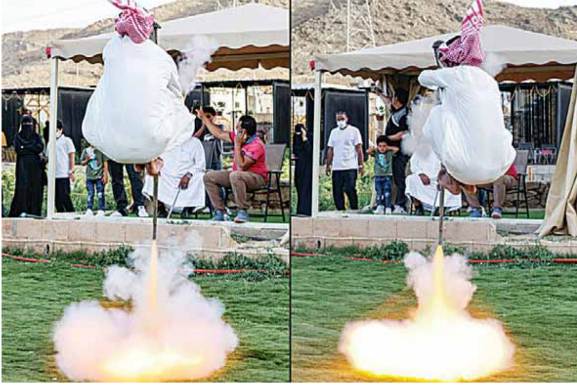
This combination of pictures shows Saudi folklore dancers performing the art of "Taasheer", a traditional dance of the people of Taif, 750 kilometers west of Saudi Arabia's capital Riyadh.