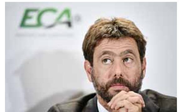
GENEVA: In this file photo taken on September 10, 2019 Chairman of the European Club Association (ECA) Andrea Agnelli gives a press conference in Geneva, at the end of the general assembly of the organization representing the interests of professional association football clubs in UEFA.

If UEFA decide that Bilbao, in the Basque