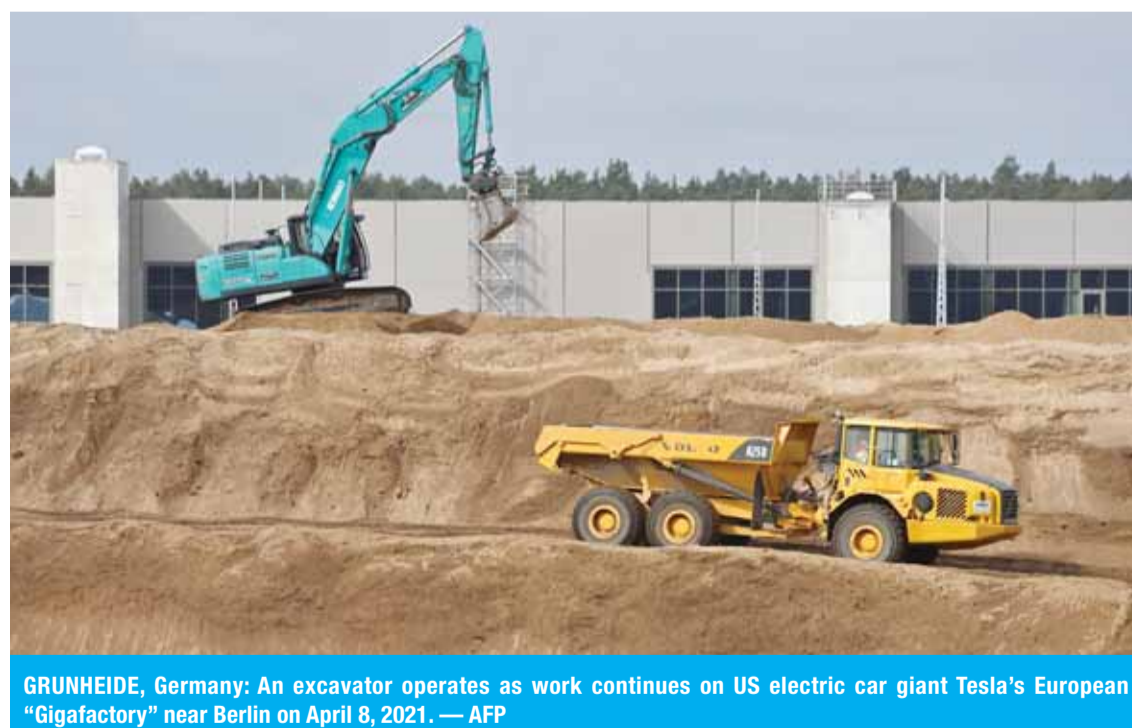
GRUNHEIDE, Germany: An excavator operates as work continues on US electric car giant Tesla's European "Gigafactory" near Berlin on April 8, 2021.

The extra demand could place a huge burden on a region already affected by water shortages and hit by summer droughts for the past three years.