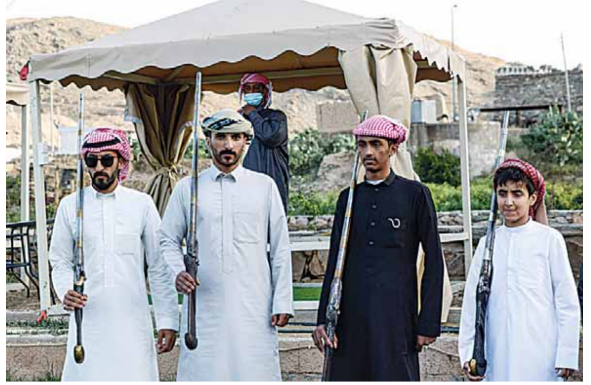
Picture shows Saudi folklore dancers performing the art of "Taasheer".