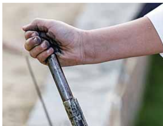
Prince Mohammed bin Salman, Saudis are seeking to maintain some long-held traditions.

They bounce up and down with their knees pressed close together, as they wave the gun and finally reach for the sky and fire at the ground, resulting in a blast of sparks and smoke under their feet. A tribal tradition believed to date back hundreds of years, the dance is now performed at weddings, festivals and on other special occasions. In a rapidly modernizing kingdom, which is undergoing dramatic economic and social reforms spearheaded by the de facto ruler, Crown