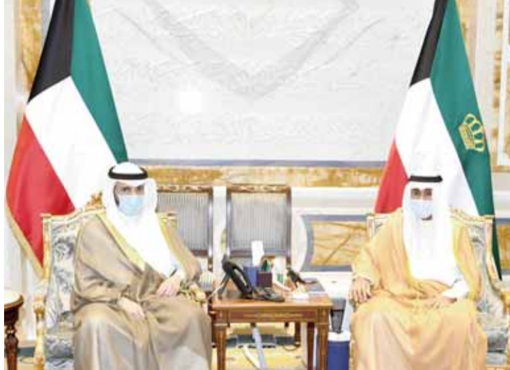
His Highness the Amir Sheikh Nawaf Al-Ahmad Al-Jaber Al-Sabah meets National Assembly Speaker Marzouq Al-Ghanem.