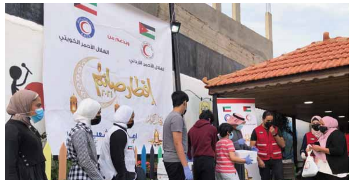
AMMAN: Kuwait Red Crescent Society workers distribute food as part of a project to offer free meals to 15,000 Syrian refugees in Jordan throughout Ramadan.

1. Read the Quran since, after all, fasting in Ramadan is in celebration of the revelation of this Holy Scripture: "The month of Ramadan [is that] in which was revealed the Qur'an, a guidance for mankind and clear proofs of guidance and criterion. So whoever sights [the new moon of] the month, let him fast it" (Quran 2:185). Many Muslims will try to