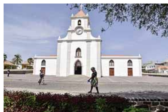
People walk past a church in Tarrafal.