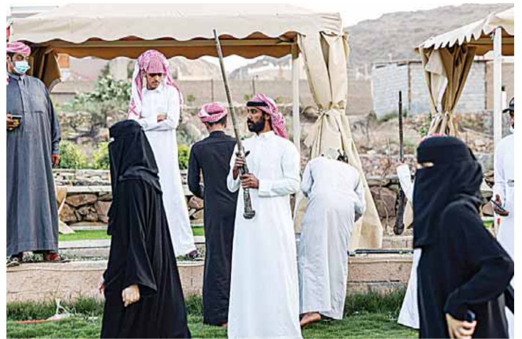
This combination of pictures shows Saudi folklore dancers performing the art of "Taasheer."

In Saudi Arabia's west, classic muzzle-loading rifles are carefully prepared for the traditional "Taasheer" war dance, a striking display of leaping and gunpowder blasts. Men and boys take weapons laid out in the bed of a truck and fill the barrels with gunpowder before, one by one, they take center stage to showcase their skills in what is also known as the fire dance. Dozens of onlookers, including women and children, stand on the sidelines of a grassy clearing lined with gazebo tents. In a collision of the ancient and the modern, some hold up mobile phones to film the spectacle. Barefoot and in their traditional thobe and ghutra headpiece, the performers dance to traditional music against the backdrop of mountains in the western province of Taif.