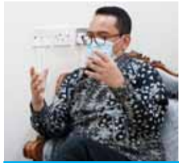
KUWAIT: Indonesian Ambassador to Kuwait Tri Tharyat speaks to Kuwait Times.

By the way, we are open to countries that can provide maximum protection to our people. We have domestic helpers in Singapore, Korea, Thailand and Malaysia. Of course with our economic growth in past years, we help our people find jobs in Indonesia itself, but we cannot deny anyone from seeking to work abroad for maybe a bigger salary.