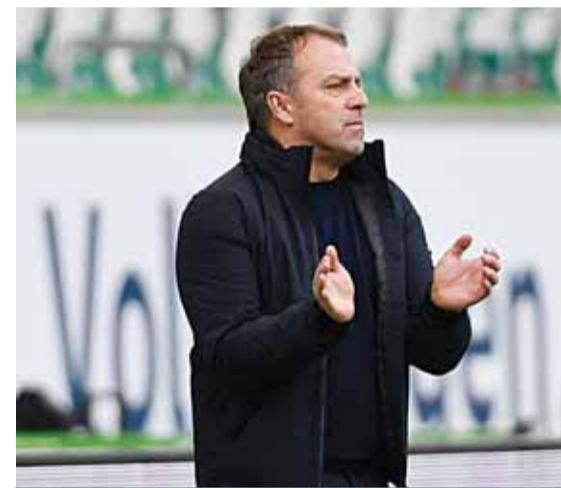
WOLFSBURG: Bayern Munich's German head coach Hans-Dieter Flick reacts during the German first division Bundesliga football match between VfL Wolfsburg and FC Bayern Munich in Wolfsburg, northern Germany, on Saturday.

However, Bayern's top brass - president Herbert Hainer and chairman Karl-Heinz Rummenigge - have yet to confirm whether they will release Flick from his contract. Last month, Rummenigge said that he would "have to be crazy" to grant an early contract release for Flick, who has been tipped to replace Joachim Loew as head coach of Germany.