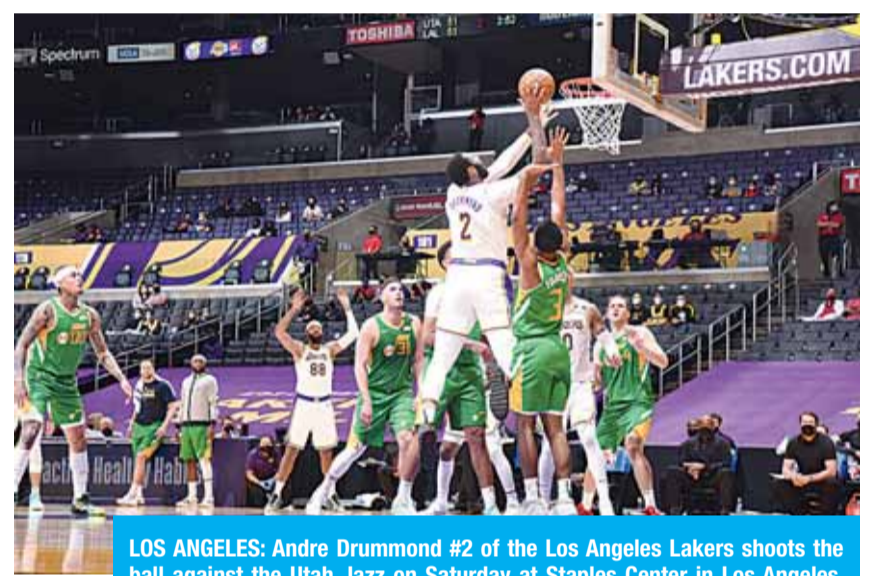
LOS ANGELES: Andre Drummond #2 of the Los Angeles Lakers shoots the ball against the Utah Jazz on Saturday at Staples Center in Los Angeles, California.

Later this month, the Lakers will travel to Washington, DC for a game but the team is not expected to visit with US President Joe Biden at the White House. COVID-19 restrictions and a tight game schedule are expected