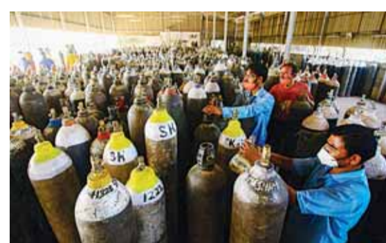
JABALPUR: Workers prepare to fill medical oxygen cylinders for hospital use on COVID-19 coronavirus patients on the outskirts of Jabalpur yesterday.