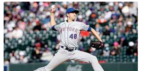
DENVER: Starting pitcher Jacob deGrom #48 of the New York Mets throws against the Colorado Rockies in the fourth inning during game one of a double header at Coors Field on Saturday in Denver, Colorado.