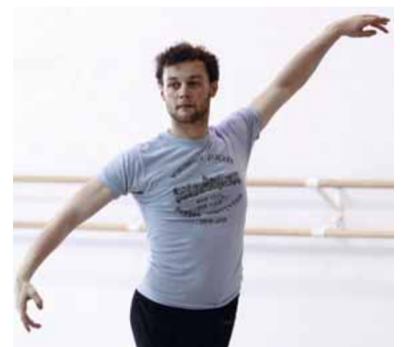
British choreographer Liam Scarlett