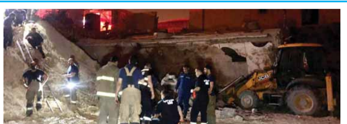
KUWAIT: Firefighters working on the scene of the collapse in Rumaihiya.