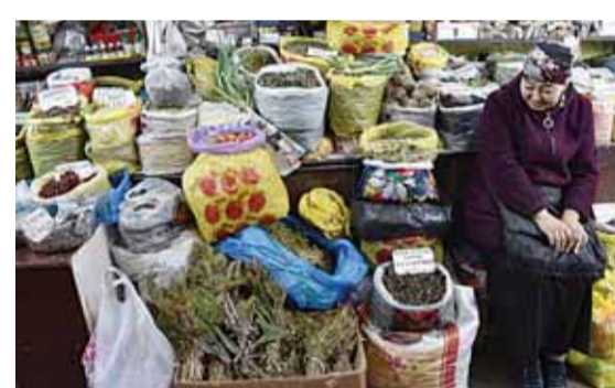
BISHKEK: A vendor sells the indigenous Aconitum soongaricum root known locally as "Issyk-Kul root" at a bazaar.