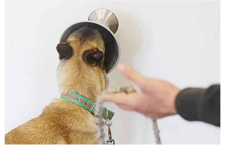
Sniffer dog Sky takes part in a training to detect COVID-19 through sweat samples at a facility in Lebanon's capital Beirut.