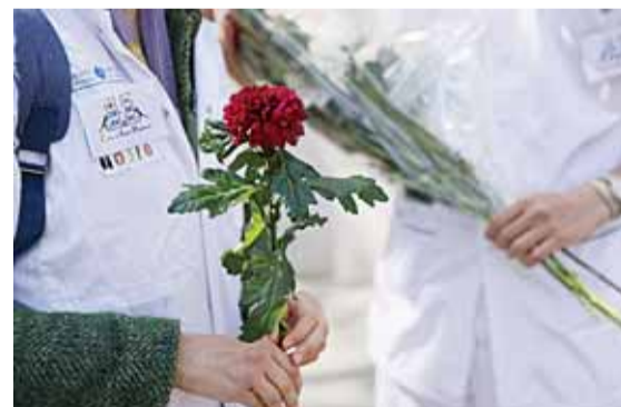
PARIS: Medical interns and families hold flowers as they pay homage to five medical interns who committed suicide since the beginning of the year during a gathering in front of the French Health Ministry to denounce the heavy workload.

However, Trump is also dogged by numerous accounts from former playing partners that he routinely cheats. "Trump doesn't just cheat at golf," wrote sportswriter Rick Reilly in the book "Commander in Cheat: How Golf Explains Donald Trump." "He cheats like a three-card Monte dealer. He throws it, boots it, and moves it. He lies about his lies. He fudges and fozzles and fluffs."