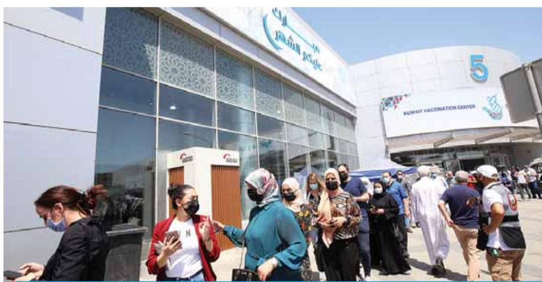
KUWAIT: People wait in line to get their vaccines against COVID-19 in front of the Kuwait Vaccination Center at the Kuwait International Fairground in Mishref yesterday. Kuwait has immunized nearly 20 percent of its population so far. (See Page 3)

Rights body urges govt to drop age-limit clause on expats' work permits