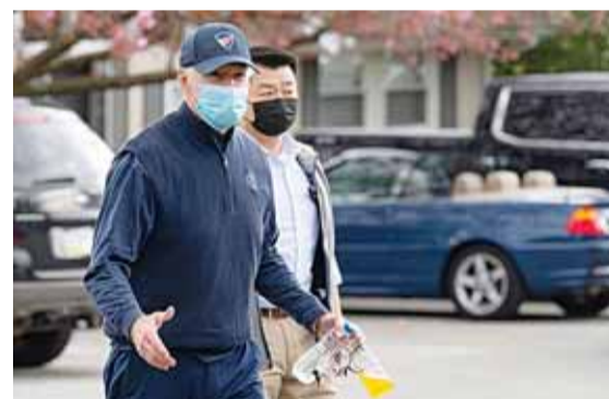
WILMINGTON, Delaware: US President Joe Biden leaves his cart after a round of golf at Wilmington Country Club Saturday.

"Together, we are committed to improving their working conditions, starting with their working hours," the minister tweeted following the meeting, but ISNI said the responses it had received were too vague.