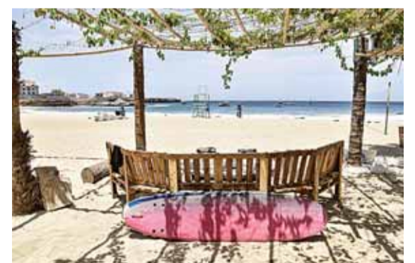
A general view of a beach in Tarrafal.