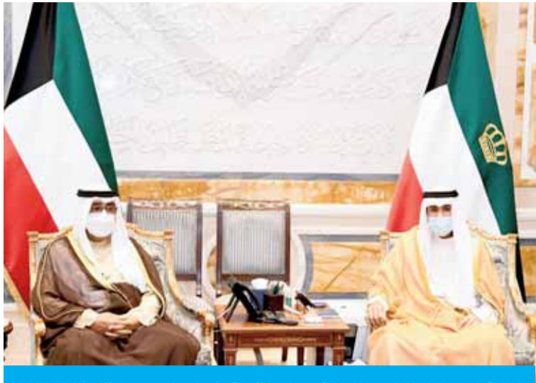
KUWAIT: His Highness the Amir Sheikh Nawaf Al-Ahmad Al-Jaber Al-Sabah meets His Highness the Crown Prince Sheikh Mishal Al-Ahmad Al-Jaber Al-Sabah.