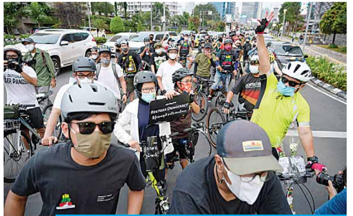
JAKARTA: Indonesian cyclists take part in a rally to show their support for democracy in Myanmar near the Myanmar embassy in Jakarta.

Much of Myanmar remains under a curfew imposed shortly after the coup, running from 8 pm to 4 am every night. Late Saturday, a young man was shot and killed in Kyaukse town in northern Shan state while riding his motorbike during the curfew. "He was shot by the authorities when he and other his friends drove motorbikes around 9 pm. He was shot in the head," a rescue worker said, adding that his funeral would take place yesterday.