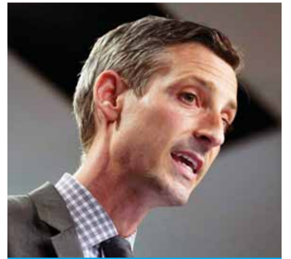
WASHINGTON: In this file photo US State Department spokesman Ned Price speaks during a press briefing at the State Department in Washington, DC.

But some observers saw the Vienna meeting as