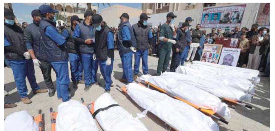
TARHUNA, Libya: Libyans take part in a funeral procession for 12 bodies that were identified from mass graves found in Tarhuna town, 80km southeast of the capital.

Now the brothers are gone, toppled from power