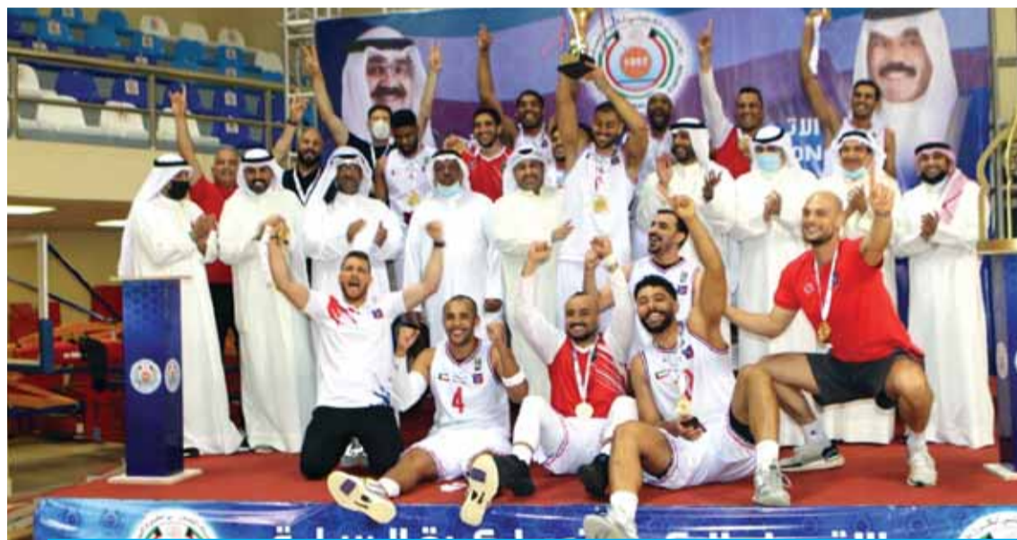
KUWAIT: Al-Kuwait players and staff celebrate with the championship's trophy. — KUNA

trailing in third. A total six clubs have each won the domestic title, the first of which was held in 1961-62. Al-Qadsiyah are the most decorated club domestically with 23 titles, followed by Al-Kuwait (12), Kazma (nine), Al-Arabi (eight), Al-Jahra (five) and Al-Sahel (one). — KUNA