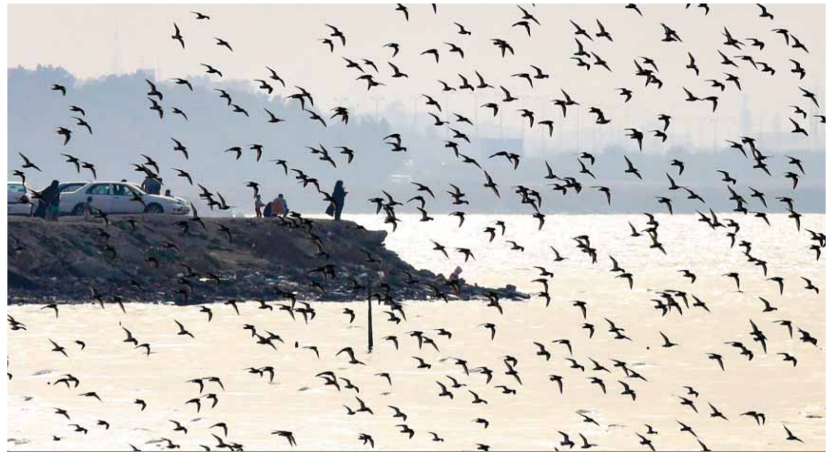
KUWAIT: People watch as a flock of birds hover above the Gulf waters, north of Kuwait City, on Friday.