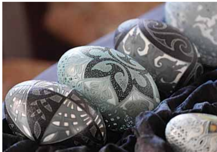
Artfully decorated Easter eggs made of goose eggs.