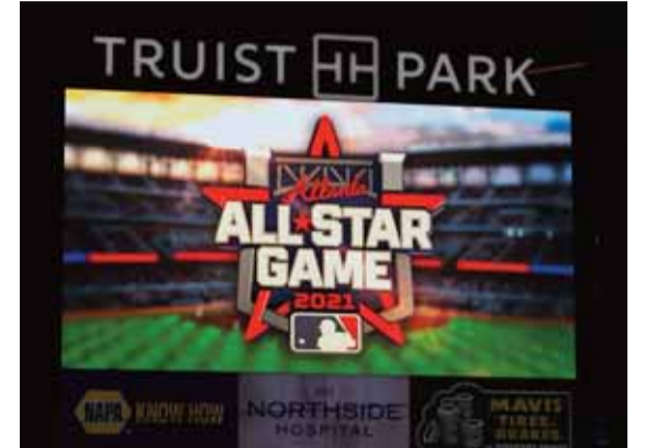
ATLANTA: In this file photo taken on September 24, 2020 the 2021 All-Star Game Logo is displayed on the screen prior to the game between the Miami Marlins and Atlanta Braves at Truist Park in Atlanta, Georgia.