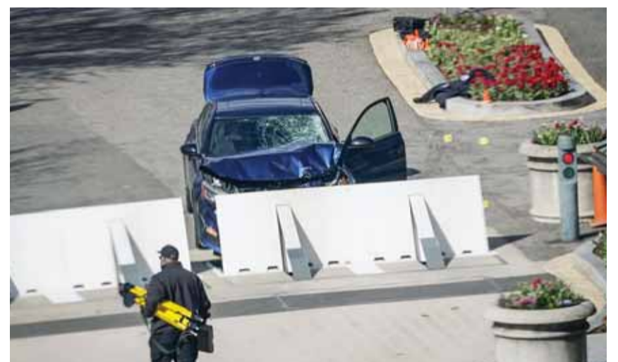
WASHINGTON: Law enforcement investigate the scene after a vehicle charged a barricade at the US Capitol on Friday.