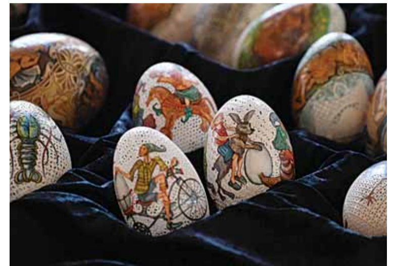
Artfully decorated Easter eggs made of goose eggs.