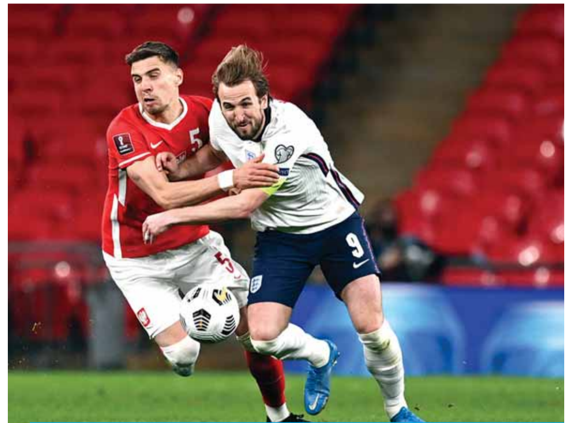
LONDON: England's striker Harry Kane (right) tangles with Poland's defender Jan Bednarek (left) during the FIFA World Cup Qatar 2022 Group I qualification football match between England and Poland at Wembley Stadium in London on March 31, 2021.

City chairman Khaldoon Al-Mubarak has revealed a statue of the striker has been commissioned to stand alongside those currently being made to honor his former team-mates David Silva and Vincent Kompany. "We know how important a player he is in the present and was in the past," said Guardiola. "These decisions are never easy." Aguero has won four Premier League titles, with a fifth looking almost certain this season. They also remain in the hunt for a historic quadruple.