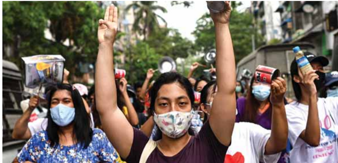
YANGON: A protester makes the three-finger salute as other make noise by hitting metal objects and singing revolutionary songs during a demonstration against the military coup in Yangon's Ahlone township yesterday.

The rebel groups' meeting also comes a week after one of them, the Karen National Union (KNU), seized a