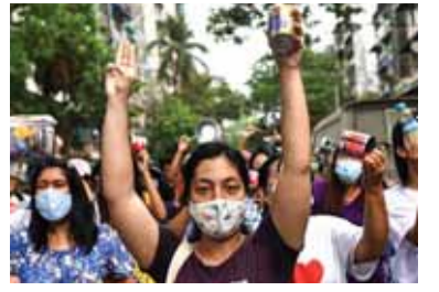
Myanmar's rebel groups voice support for protesters as junta continues crackdowns

US, Iran to start indirect talks to salvage nuclear deal