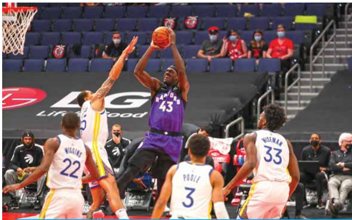
TAMPA: Pascal Siakam of the Toronto Raptors drives to the basket during the game against the Golden State Warriors on Friday at Amalie Arena in Tampa, Florida.