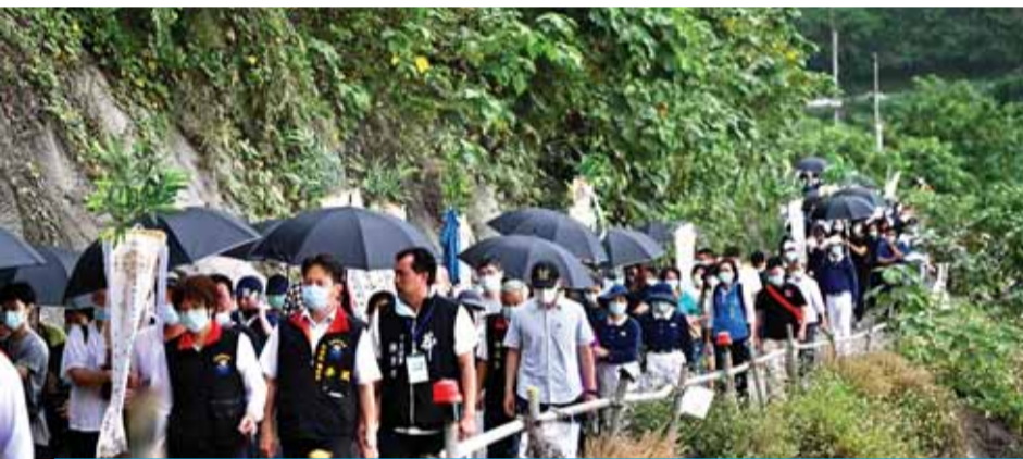
HUALIEN, Taiwan: Relatives of the victims who died on the derailed train, pray at the accident site on the mountains of Hualien, eastern Taiwan yesterday.

Taiwan's eastern railway line is a popular tourist draw down its less populated eastern coastline. With the help of multiple tunnels and bridges, it winds its way through towering mountains and dramatic gorges before entering the picturesque Huadong Valley. Friday's crash took place near two of the most famous landmarks on the eastern shoreline—the Tarako Gorge and dramatic Qingshui Cliffs. A world-class bullet train system also serves the heavily populated western side of the island. Friday's crash looks set to be one of Taiwan's worst railway accidents on record.—AFP