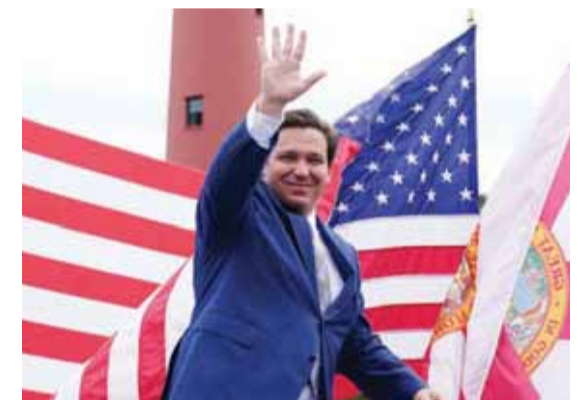
MIAMI: In this file photo Florida Governor Ron DeSantis arrives at the Jupiter Inlet Lighthouse and Museum for a campaign event with US President Donald Trump in Jupiter, Florida.

China launched a system of passports in March, with citizens able to download the new certificates and use them to enter and leave the country. It is not mandatory and is only available to Chinese citizens. The European Union is also set to propose rules for a vaccine digital "green pass" allowing people to move safely around the bloc or abroad. In Florida, a state of 21 million people which is economically dependent on tourism, nearly six million