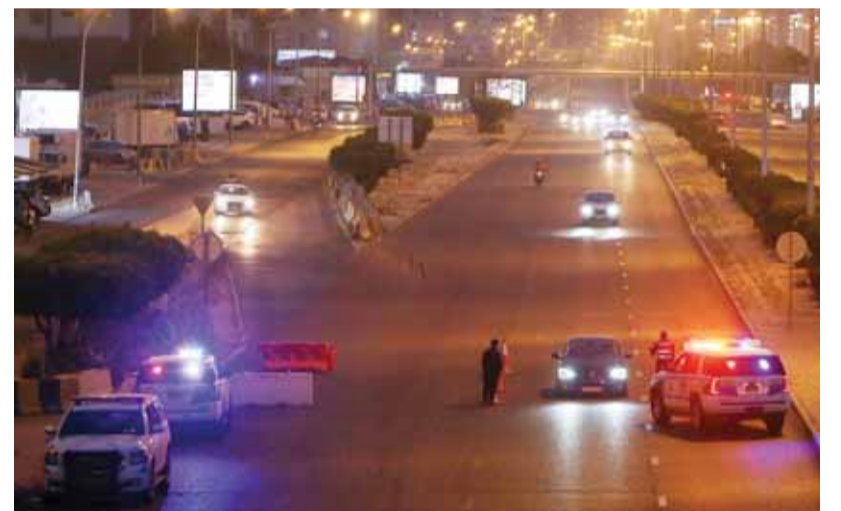
KUWAIT: Kuwaiti policemen control traffic at checkpoints on the Fourth Ring Road and King Faisal Road during a curfew imposed by the authorities in a bid to stem the spread of the coronavirus over the weekend.