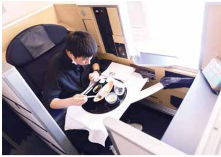
In this handout photograph by All Nippon Airways (ANA), a customer has his meal on a parked plane at Haneda airport in Tokyo.