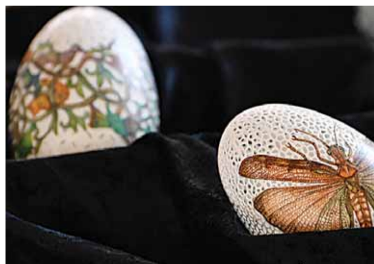
Artfully decorated Easter eggs made of goose eggs.