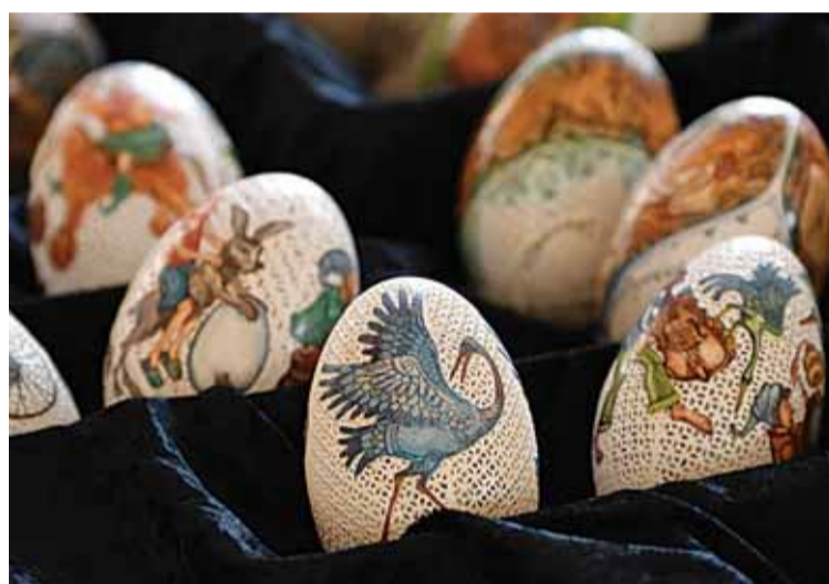
Artfully decorated Easter eggs made of goose eggs.