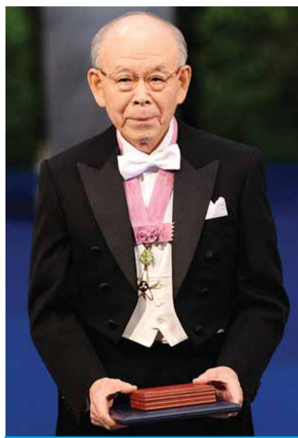
STOCKHOLM: In this file photo taken on Dec 10, 2014, Nobel Physics laureate Isamu Akasaki poses with the Nobel Prize during the 2014 award ceremony at the Stockholm Concert Hall.

Born in 1929 in Kagoshima in southern Japan, Akasaki graduated from the prestigious Kyoto University in 1952. After working for several years as a researcher at Kobe