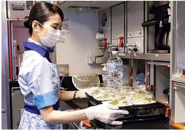
In this handout photograph taken by All Nippon Airways (ANA), a flight attendant prepares food for customers on a parked plane at Haneda airport in Tokyo. —AFP photos