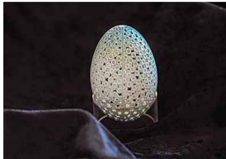
Artfully decorated Easter eggs made of goose eggs.