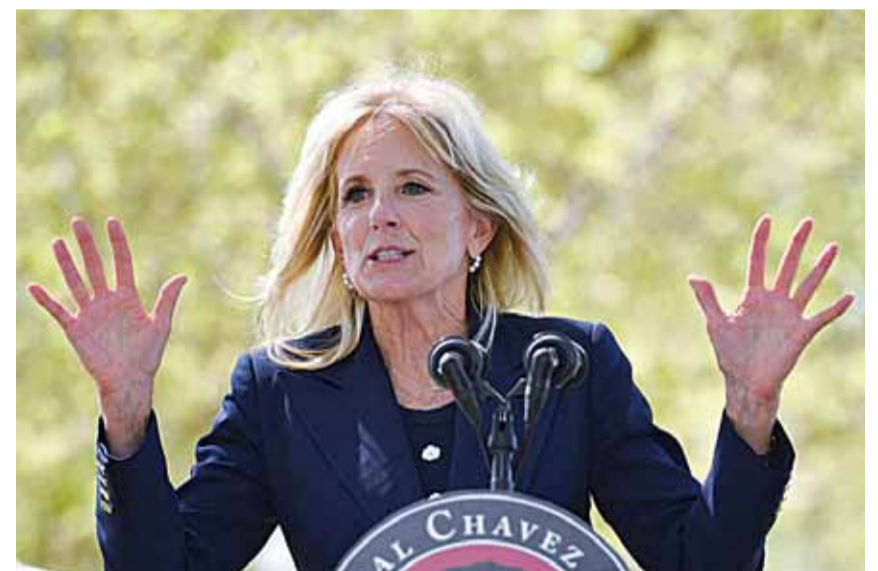
US First Lady Jill Biden speaks during a visit at The Forty Acres, the first headquarters of the United Farm Workers labor union, in Delano, California.

ther innovate the music industry,” Braun said of the merger. BTS have ascended to global superstardom since their debut in 2013, and their single “Dynamite” entered the Billboard Hot 100 at number one last year, making them the first South Korean act to top the US chart. In October, HYBE made a multi-billion-dollar stock market debut. The merger was to “accelerate its entrance into the global market”, the company said in one of the regulatory filings.