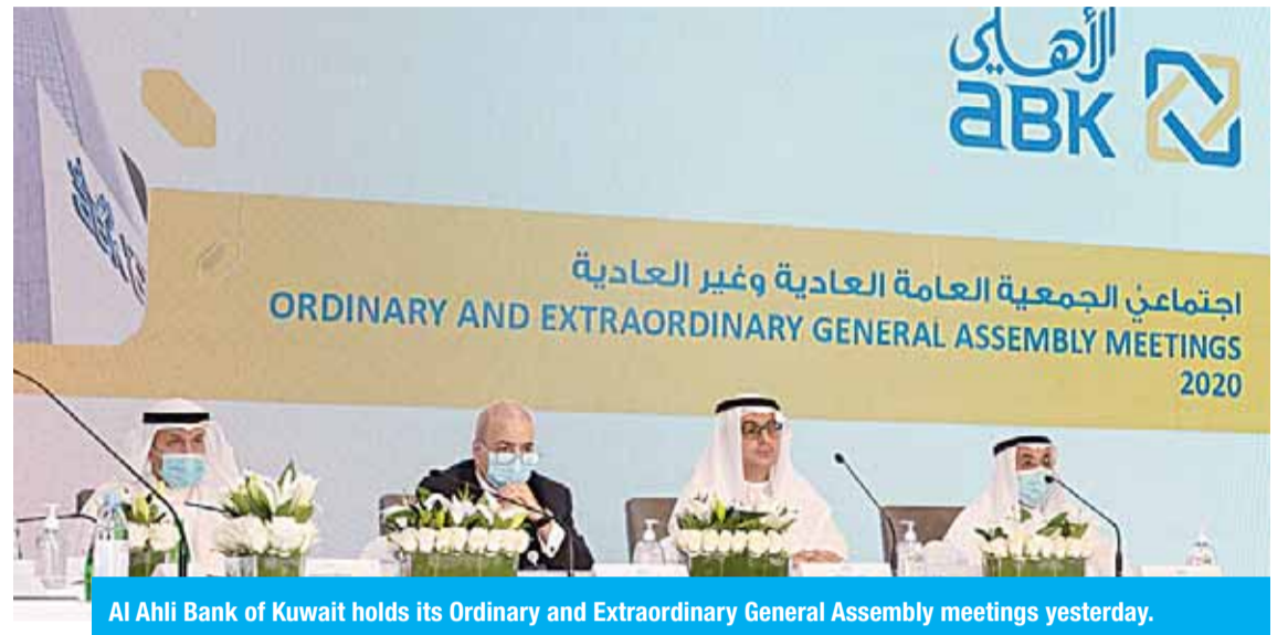
Al Ahli Bank of Kuwait holds its Ordinary and Extraordinary General Assembly meetings yesterday.

ciency. The bank is implementing a comprehensive strategy of "transformation and growth" with a careful review of risks at Group level, to better analyze and understand the strengths and weaknesses in order to mitigate the threats while taking advantage of new market opportunities. The results that we will reach will allow us to formulate a road map for transformation in the coming years that will lead us to achieve our new ambitions and aspirations."