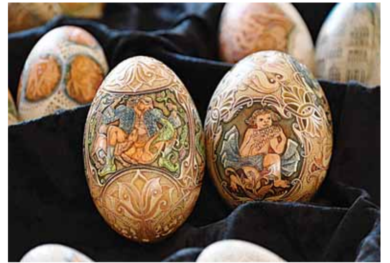
Artfully decorated Easter eggs made of goose eggs.