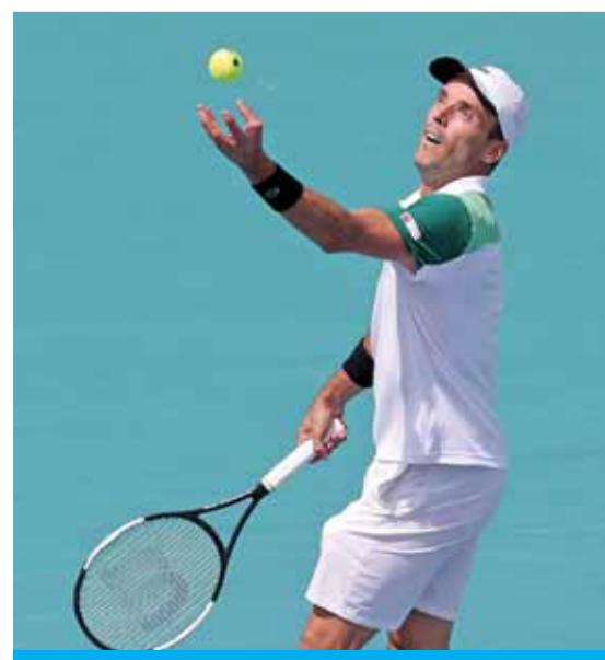
MIAMI GARDENS: Roberto Bautista Agut of Spain serves to Jannik Sinner of Italy in the semifinals during the Miami Open at Hard Rock Stadium on Friday in Miami Gardens, Florida.

Sinner seeks his third career ATP title after last year at Sofia and February in an Australian Open tune-up at Melbourne. As excited as he was at reaching the final, he kept a long-term perspective about what it meant for his career. "This kind of stuff can help you a lot. It's good to be in finals here but it doesn't mean anything," Sinner said. "The road is very long and I want to improve day after day and we'll see what's coming." Bautista, who ousted Russian top seed Daniil Medvedev in the quarter-finals, missed out on his second career ATP Masters 1000 final after 2016 at Shanghai, where he lost to Britain's Andy Murray.