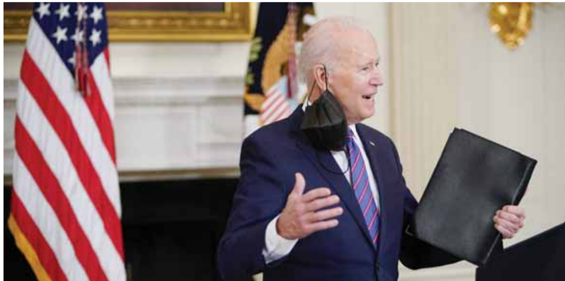
WASHINGTON: US President Joe Biden speaks to reporters after talking about the March jobs report in the State Dining Room of the White House on April 2, 2021.

The gain in nonfarm payrolls, which far exceeded the consensus estimate among economists, reflects the accelerating recovery as vaccinations become more widely available, as well as the injection of more government stimulus which sent cash to most households and expanded support to businesses. And with upward revisions to hiring in the first two months of 2021, employment in January and February combined was 156,000 higher than previ-