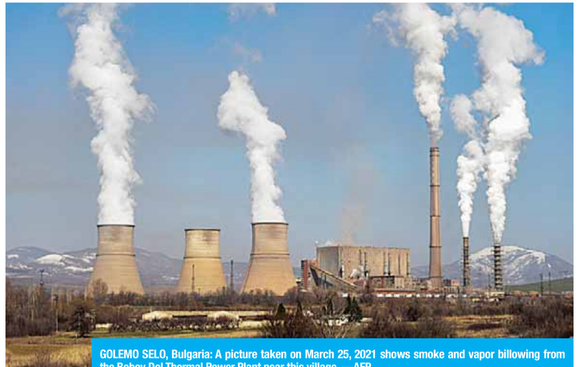
GOLEMO SELO, Bulgaria: A picture taken on March 25, 2021 shows smoke and vapor billowing from the Bobov Dol Thermal Power Plant near this village.