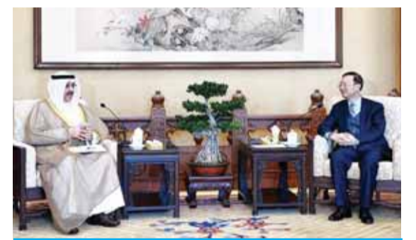
BEIJING: Director of the Central Foreign Affairs Commission Office and Chinese Communist Party (CCP) Politburo member Yang Jiechi meets Kuwaiti Ambassador to China Samih Jawhar Hayat.

The Chinese official went on to praise the wisdom, sophistication and balance of Kuwait's foreign policy, led by its leadership, and its efforts to consolidate the foundations of peace and stability in the region, according to a Kuwait Embassy statement.