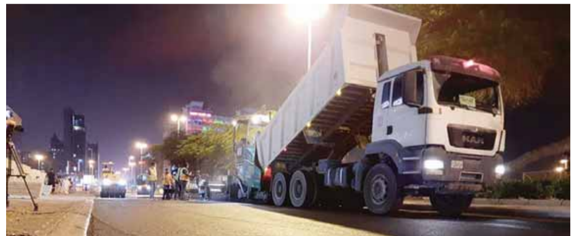
KUWAIT: One million square meters of asphalt has been applied on roads around the country since the curfew started on March 7, the Ministry of Public Works announced.