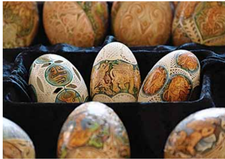
Artfully decorated Easter eggs made of goose eggs are seen in the workshop of Tunde Csuhaj in the town of Szekszard.