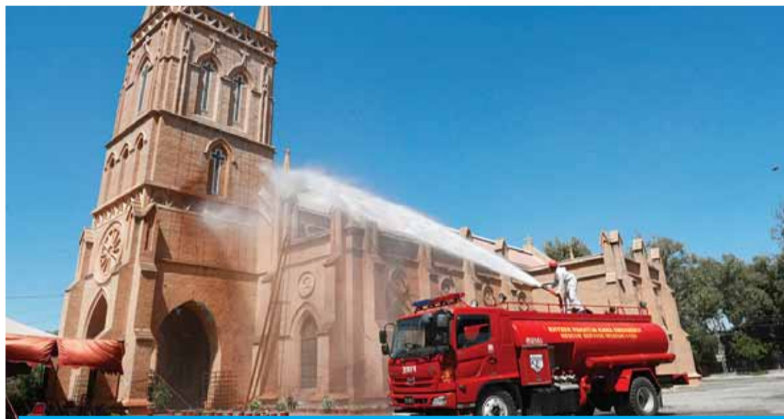
PESHAWAR: A water cannon is used to disinfect St John's Cathedral Church as a preventive measure against COVID-19 on the eve of Easter yesterday.

Philippines extends lockdown in economic hub • US logs 100m vaccinations